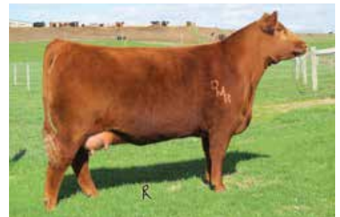
DAMAR MIMI W085 Matriarch of the "Mimi" Cow Family!