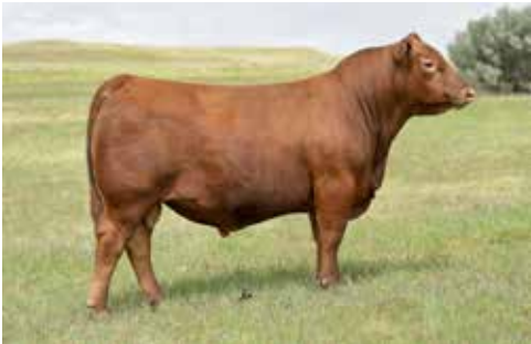
LACY COLLUSION 115F Paternal Grand sire of Lots 12-17