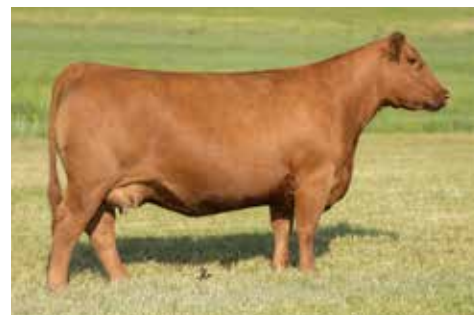
C-BAR MY OH MY MIMI 512C 3rd Generation Maternal Granddam of Lot 11