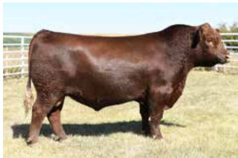
LSF SRR IDENTITY 0295H Paternal Grandsire of Lot 121