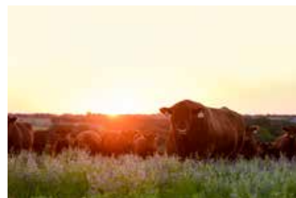
RED SOO LINE POWER EYE 161X Maternal Grand sire of Lot 113