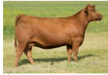
C-BAR MIMI 727E Dam of Lot 20