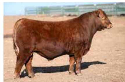
HOLTON DEFIANT 423M $50,000 Maternal Brother to Lot 101