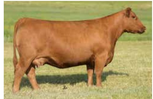
C-BAR MY OH MY MIMI 512C Maternal Granddam of Lot 67