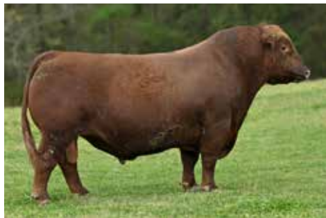
4MC KING OF THE COWBOYS 706 $210,000 Paternal Grand sire of Lots 65-72