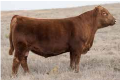
C-BAR ONE WAY 37E Maternal Grand sire of Lot 51