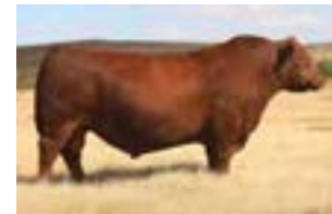
KJL/CLZB COMPLETE 7000E Sire of Lots 105 & 106