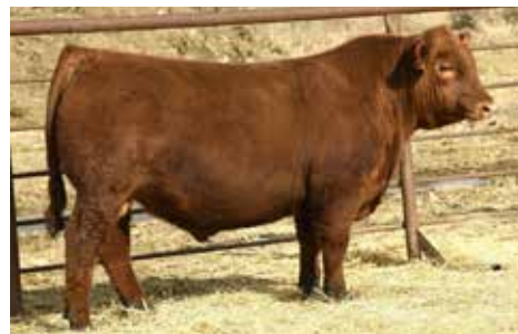
BERWALD PVF OUTRIGHT 221L