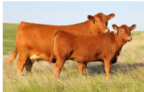
C-BAR MS STONY A302 Iconic Maternal Granddam of Lot 57