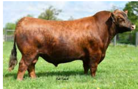
9 MILE FRANCHISE 6305 $105,000 Full Brother to Maternal Granddam of Lot 2