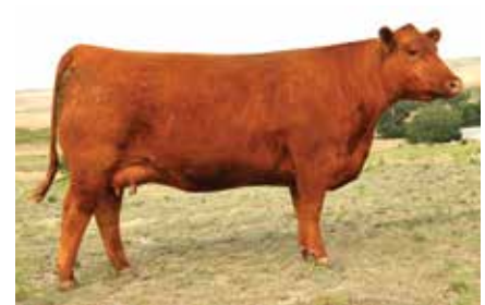
C-BAR STONY W928 Maternal Granddam of Lot 28