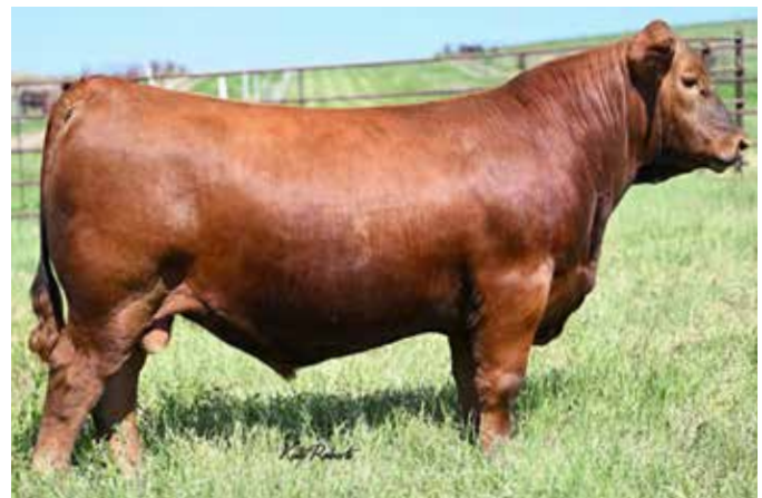
BERWALD CONFIDENT 2044 Sire of Lot 76

• He's got a balanced set of upper end numbers. In terms of indexes, he ranks in the top 20% for ProS and GM and top 25% for HB with several single traits in the top 15% of the breed.