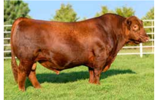
PIE QUARTERBACK 789 Maternal Grand sire of Lot 48