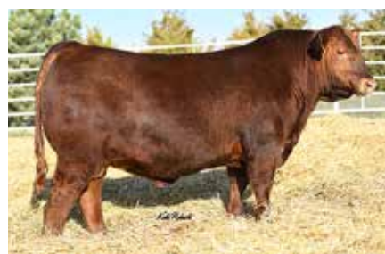
PIE COMMANDER 0100 Sire of Lot 112