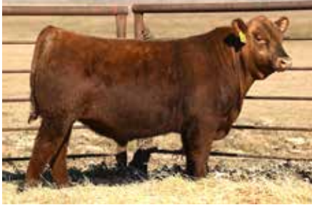
BERWALD WINGMAN 3092 Sire of Lots 58-63