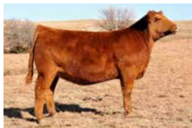
C-BAR-RJ ABIGRACE A30 3rd Generation Maternal Granddam of Lot 4