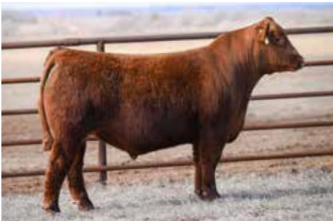
4MC YOUNGBLOOD 3043 Sire of Lot 104