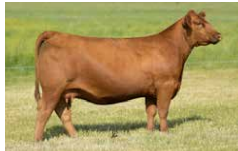
C-BAR MIMI 727E Paternal Granddam of Lot 37