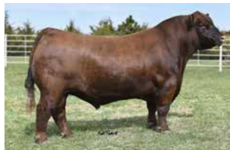
ROJAS TR CHIVAS 17109 Paternal Grand sire of Lot 39