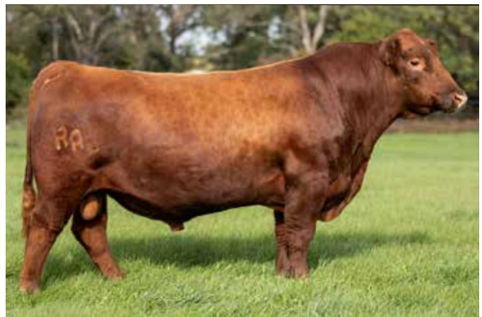
BIEBER JUMPSTART J137 Sire of Lot 64