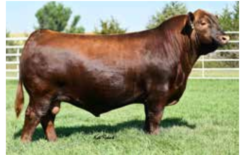
PIE CAPTAIN 057 Paternal Grand sire of Lot 58-63