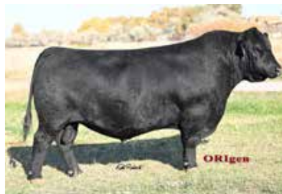
BASIN KEYSTONE 2021 Sire of Lot 81