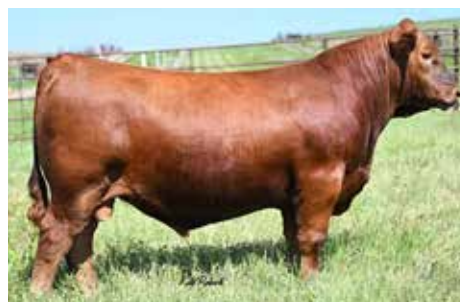
BERWALD CONFIDENT 2044