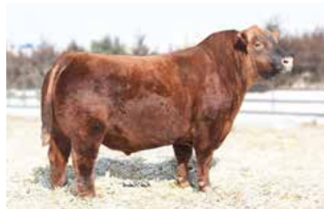
PIE JUST RIGHT 540 Sire of Lot 57