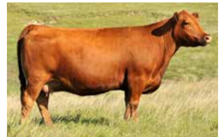
C-BAR ABIGRACE Y11