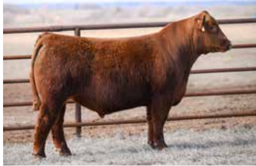
4MC YOUNGBLOOD 3043 Sire of Lots 65-72