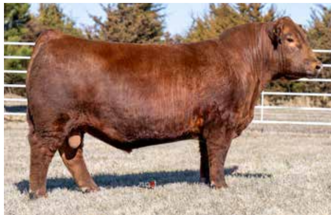
PIE HOLLYWOOD 222 $400,000 Sire of Lot 32