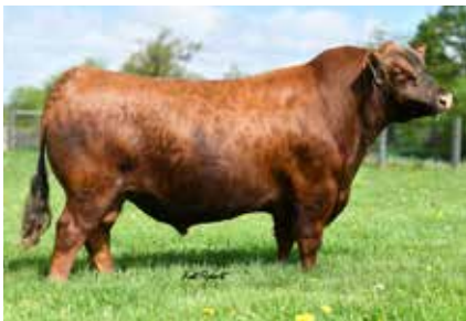
9 MILE FRANCHISE 6305 Paternal Grand sire of Lots 23-27