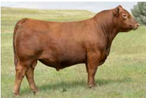
LACY COLLUSION 115F Paternal Grand sire of Lots 78-80