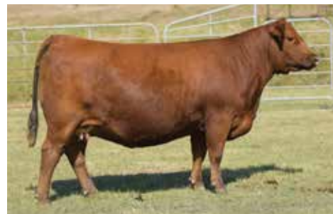
C-BAR ABIGRACE 635D Prolific Maternal Granddam of Lot 2