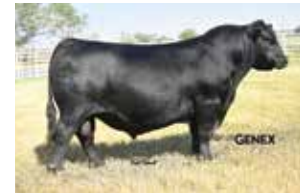
DB ICONIC G95 Sire of Lots 42 & 43