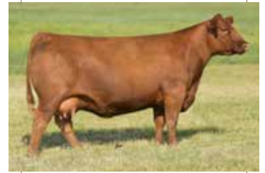
C-BAR MISS MIMI 458B Maternal Granddam of Lot 20