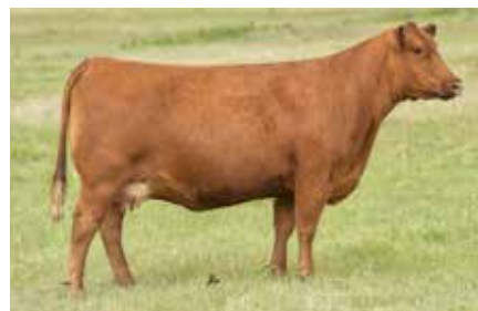
C-BAR ABIGRACE 636D Paternal Granddam of Lot 112