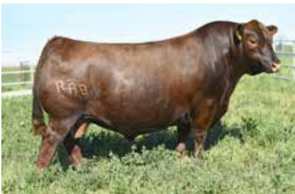
BIEBER CL ENERGIZE F121 Sire of Lot 28

• No matter the goal, 4075M has to the tools to achieve!