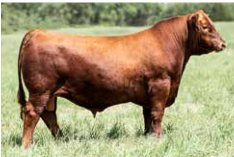
BIEBER CL STOCKMARKET E119 Maternal Grand sire of Lot 70