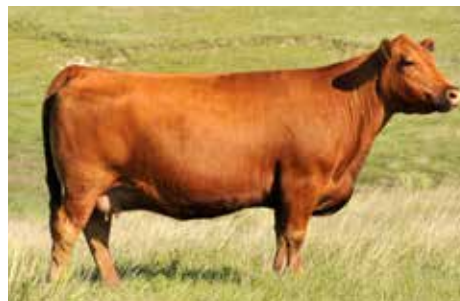
C-BAR ABIGRACE Y11

Iconic 4th Generation Maternal Granddam of Lots 1 & 2