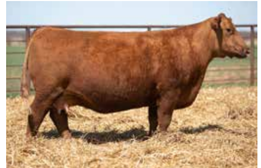
C-BAR-RJ TILLY 595C Maternal Granddam of Lot 71