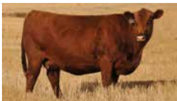
LASO LEANNA BC114R Maternal Granddam of Lot 3