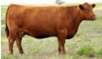
C-BROWN&KM ABIGRACE T715 Maternal Granddam of Lot 56