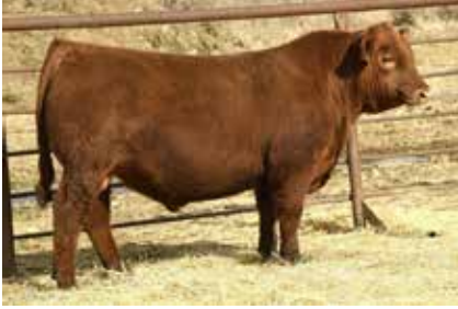
BERWALD PVF OUTRIGHT 221L Sire of Lots 107-109