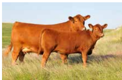
C-BAR MS STONY A302 Maternal Granddam of Lot 101