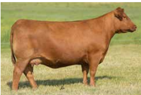
C-BAR STONY 502C Maternal Granddam of Lots 13 & 14