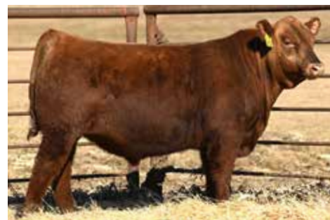
BERWALD WINGMAN 3092 Sire of Lots 114-117