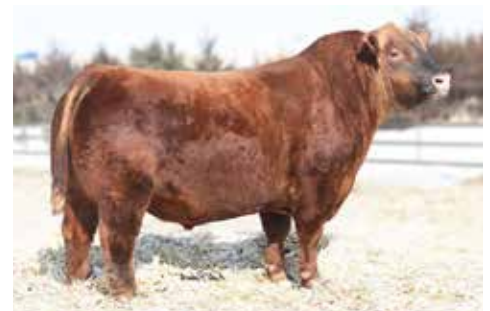
PIE JUST RIGHT 540 Maternal Grand sire of Lot 49