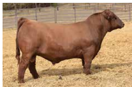
WEBR MAXED OUT 627 Paternal Grand sire of Lots 38 & 39