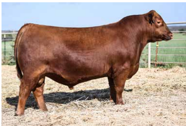
HOLTON BRICKHOUSE 3059L ET $47,000 Maternal Brother to Sire of Lot 122