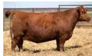
C-BAR STONY 720E Maternal Granddam of Lot 34