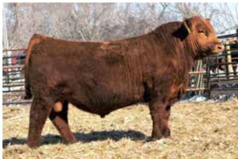
BERWALD COMPLETELY 2056 Sire of Lots 8 & 9