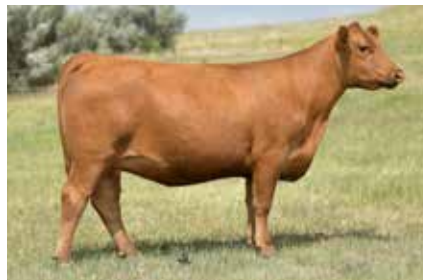
C-BAR STONY 7010E Dam of Lot 28