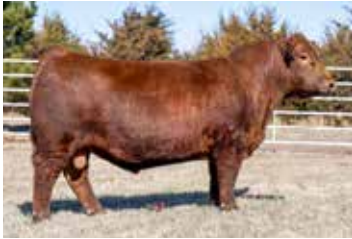
PIE HOLLYWOOD 222 $400,000 Sire of Lot 77