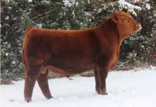
AHL FLASHBACK 446B Paternal Grand sire of Lots 35 & 36