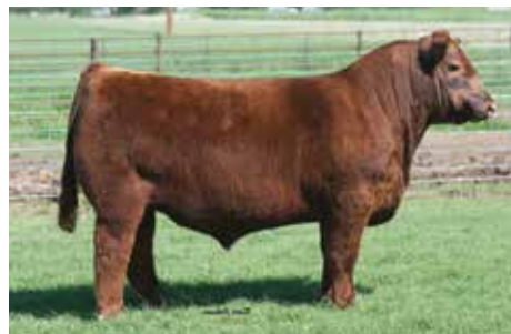
PZC TMAS FIRESTORM 1800 ET Paternal Grand sire of Lot 38