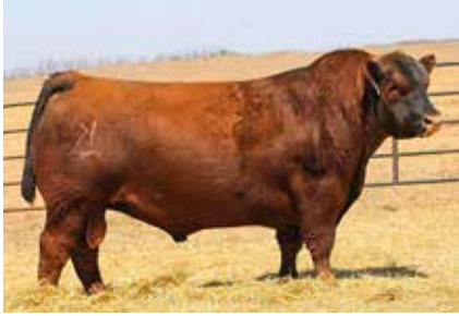
RREDS BLUE PRINT H001 Maternal Grandsire of Lot 115