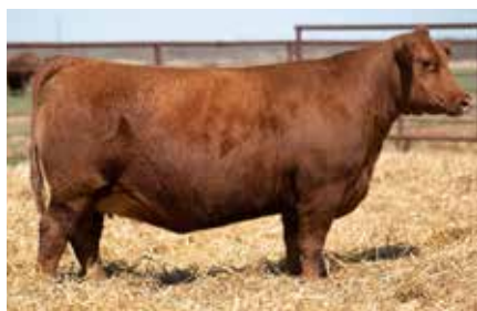
C-BAR STONY 720E Dam of Lot 101