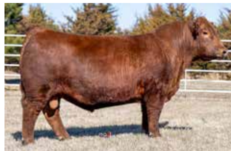
PIE HOLLYWOOD 222 $400,000 Sire of Lots 101-103