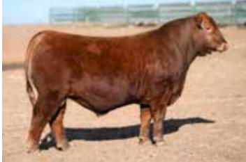
HOLTON DEFIANT 423M $50,000 Maternal Brother to Lot 50