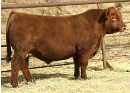
BERWALD PVF OUTRIGHT 221L Sire of Lot 120