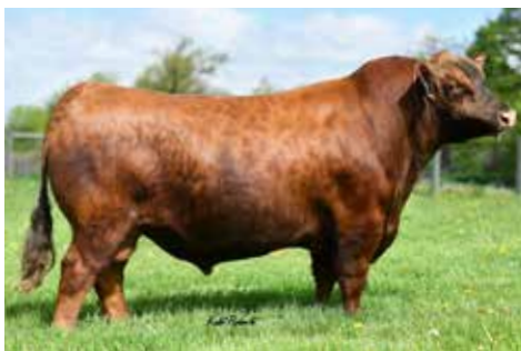
9 MILE FRANCHISE 6305 $105,000 Full Brother to Dam of Lot 9