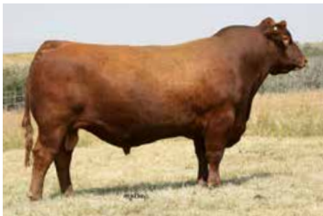
RED FINE LINE MULBERRY 26P Maternal Grand sire of Lot 63