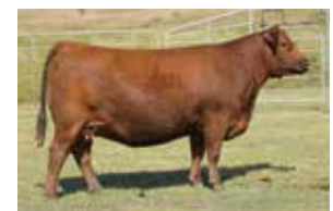
C-BAR ABIGRACE 635D Dam of Lots 105 & 106