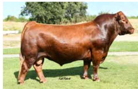
C-BAR WHISKEY RIVER 8105F Paternal Grand sire of Lot 37