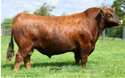
9 MILE FRANCHISE 6305 $105,000 Full Brother to Dam of Lot 55