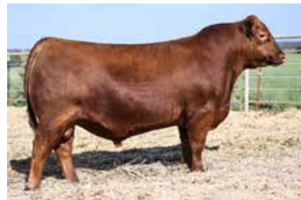
HOLTON BRICKHOUSE 3059L ET $47,000 Full Brother to Lot 45