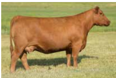
C-BAR MY OH MY MIMI 512C Paternal Granddam of Lots 23-27