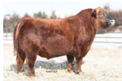
PIE JUST RIGHT 540 Paternal Grand sire of Lots 10 & 11