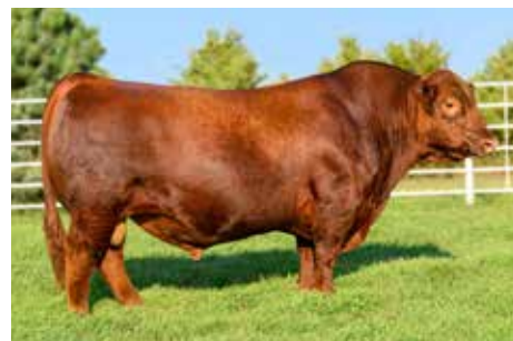
PIE QUARTERBACK 789 Paternal Grand sire of Lots 33 & 34