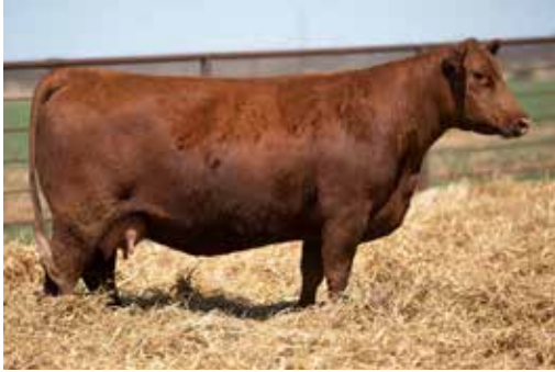
C-BAR ABIGRACE 755E Maternal Granddam of Lot 103