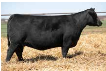
C-BAR ABIGRACE 814F Dam of Lots 40 & 41