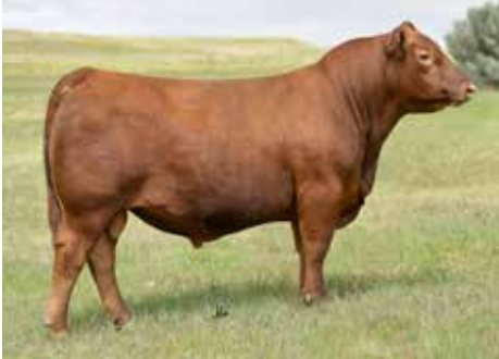
LACY COLLUSION 115F Maternal Grand sire of Lot 69