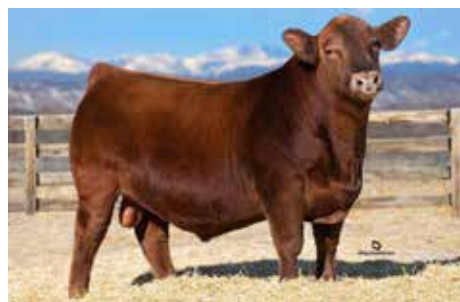
J6 MAXED OUT 121G Sire of Lots 38 & 39