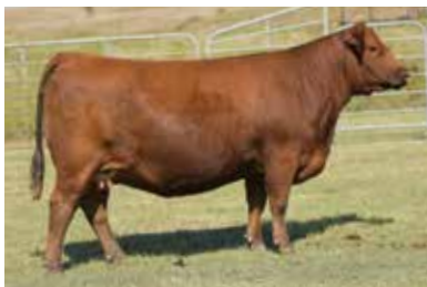
C-BAR ABIGRACE 635D Maternal Granddam of Lots 58 & 59