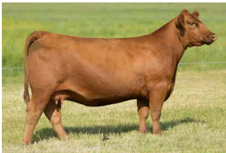
C-BAR MIMI 727E Paternal Granddam of Lots 123 & 124