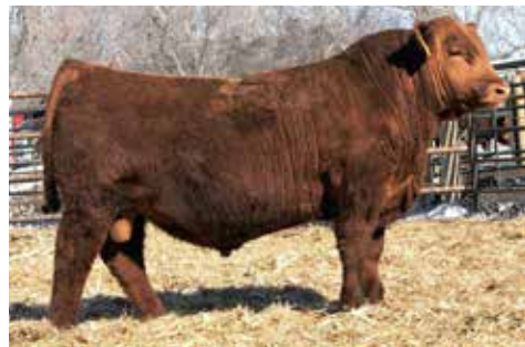
BERWALD COMPLETELY 2056 Sire of Lot 46