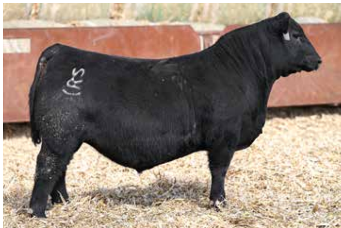
LOT 58 - RIDGE KADOKA 5083