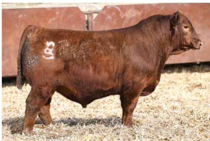
LOT 55 - RIDGE STEALTH 5537