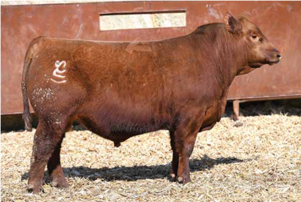
LOT 29 - RIDGE GOLD BAR 5045