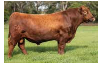
BIEBER JUMPSTART J137 Sire of Lots 7-11