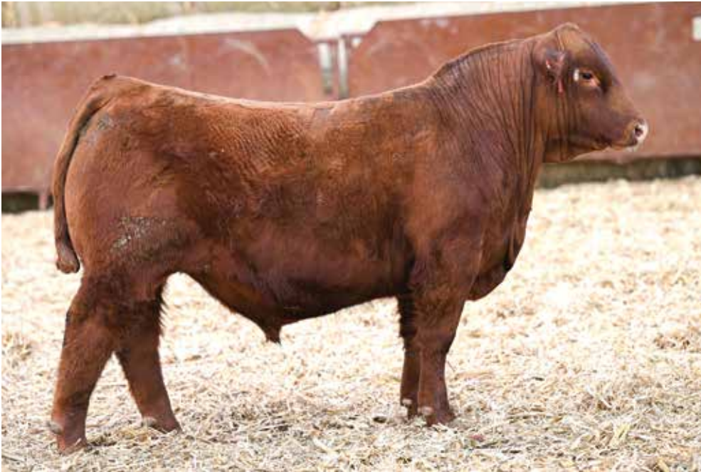
LOT 50 - COOKSLEY ONE OF A KIND 504