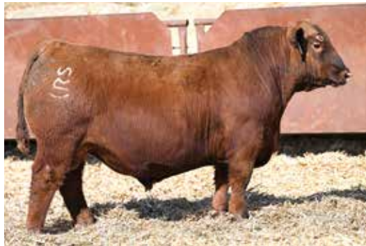
RIDGE RANCH HAND 5078 Maternal Brother to Lots 34 & 35 He Sells as Lot 1