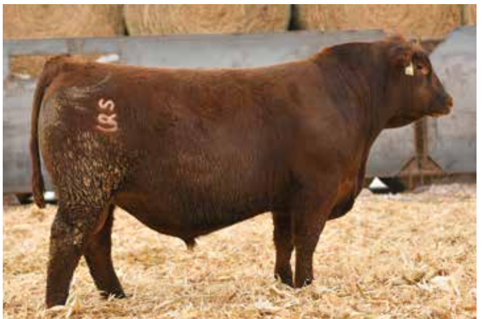
RIDGE NAVIGATOR 0039 - Maternal Brother to Lots 1-3