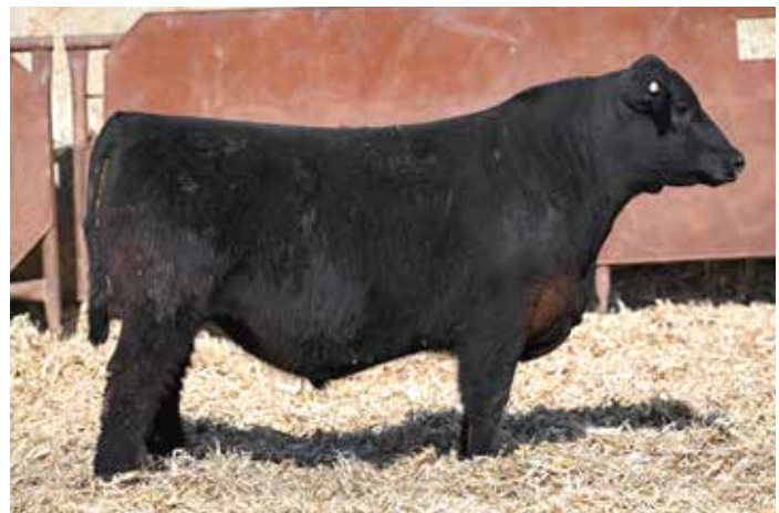
LOT 62 - RIDGE KADOKA 5036