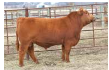
LACY GOLD BAR 0251 400 Sire of Lots 27-30