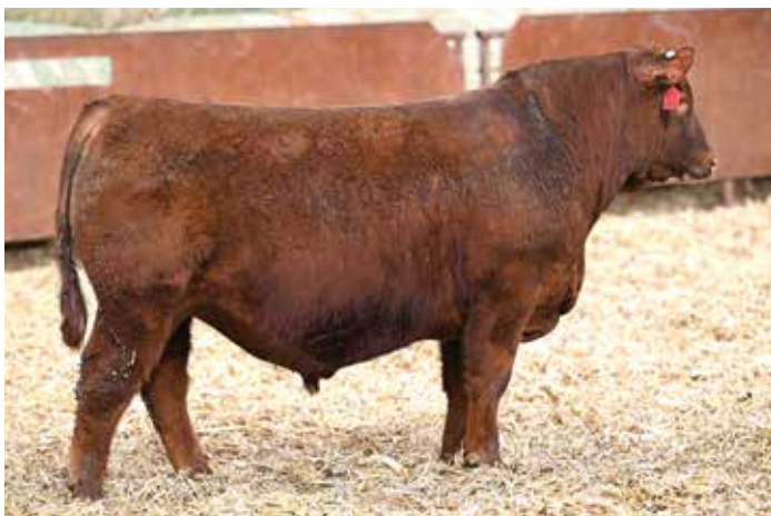
LOT 41 - COOKSLEY TRUE NORTH 513