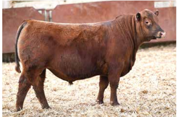
LOT 36 - COOKSLEY KING JAMES 506