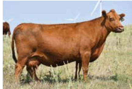
RIDGE AQUILA 552-8066 Paternal Granddam of Lots 24-26