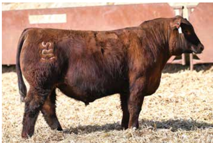
LOT 16 - RIDGE FOREMAN 5533