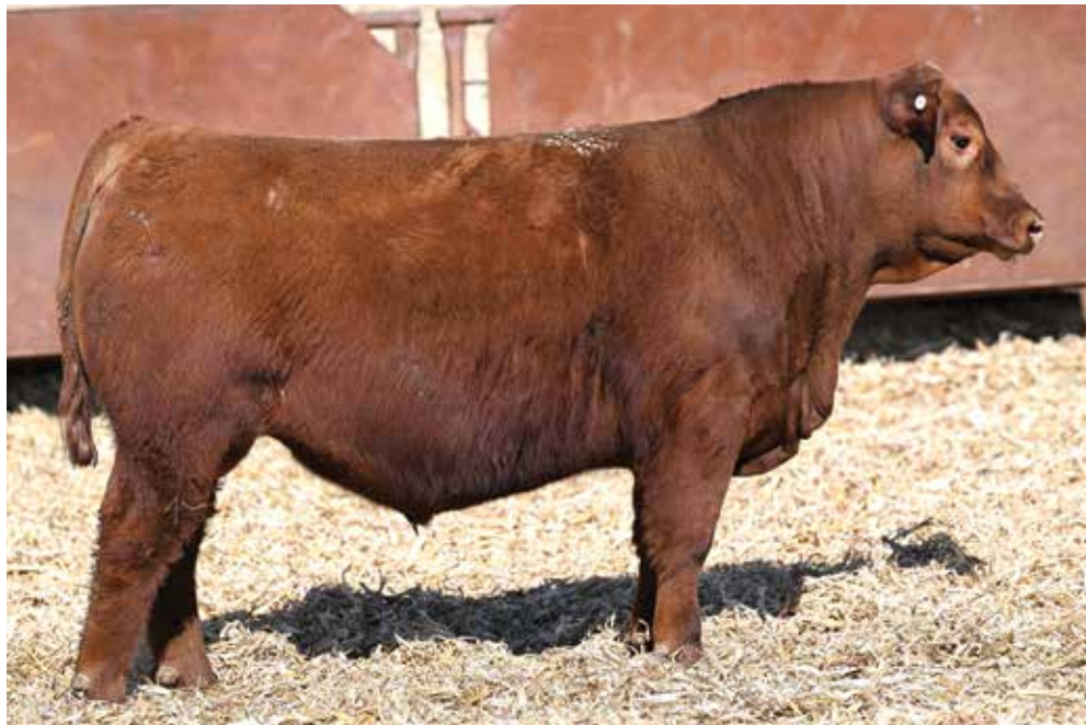
LOT 32 - RIDGE INTRIGUE 5145