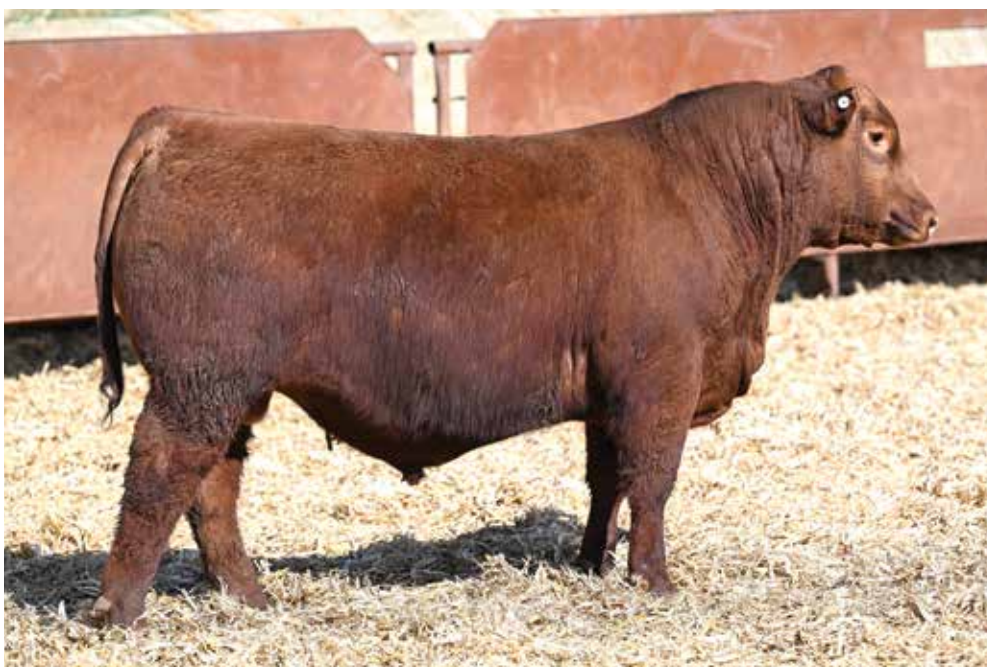
LOT 28 - RIDGE GOLD BAR 5090