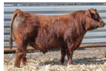
TAC DRIFTER H10 Paternal Grand sire of Lots 1-4