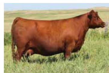
U2 BEAUTY 113Z Paternal Granddam of Lot 109