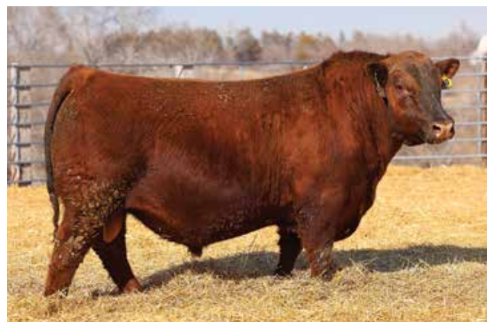
STRA RANCH HAND 2010 - Proven Sire of Lots 1-3