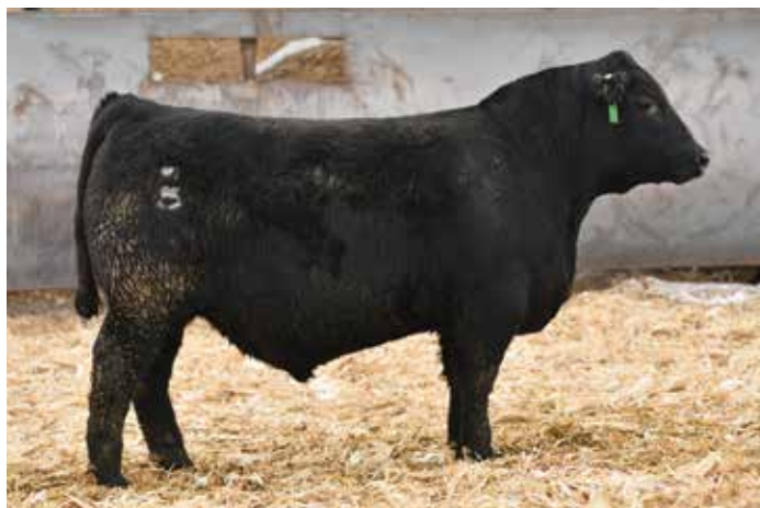
RIDGE BANK NOTE 0516 - Maternal Grand sire of Lot 113