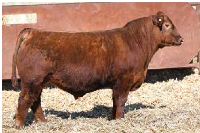
LOT 54 - RIDGE STEALTH 5508