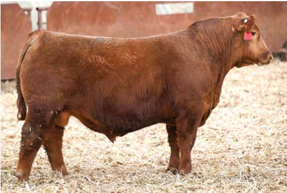
LOT 8 - COOKSLEY JUMPSTART 502