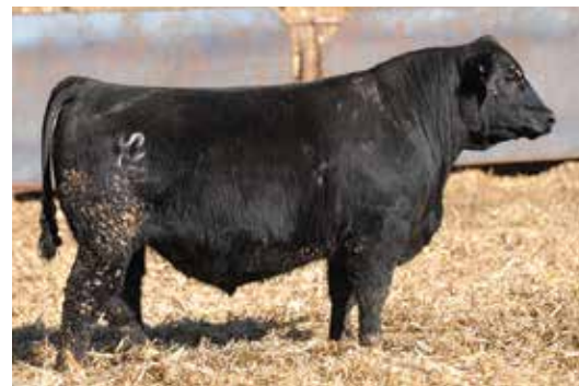
RIDGE RENOWN 3612 - Maternal Brother to Lot 18