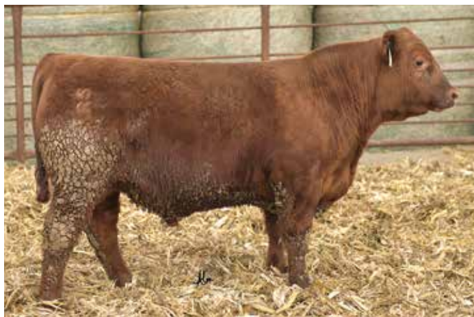
RIDGE TOPGUN 9513 Sire of Lots 103 & 104