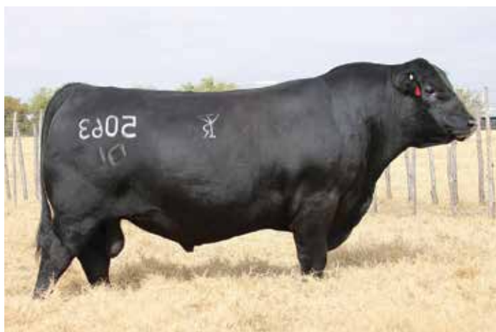
BAR R JET BLACK 5063 3rd Generation Paternal Grand sire of Lots 54-56