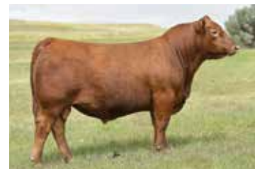
LACY COLLUSION 115F Paternal Grand sire of Lots 31-33