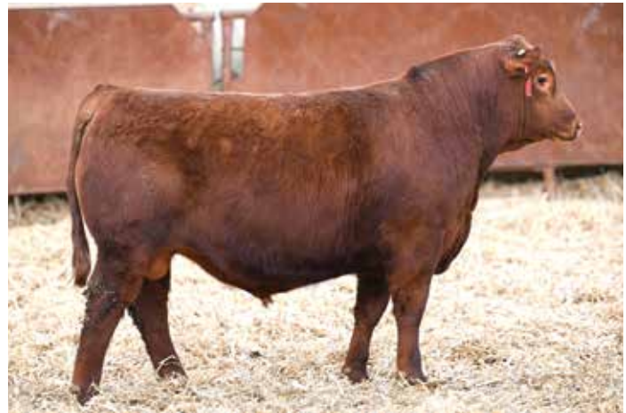
LOT 37 - COOKSLEY KING JAMES 507