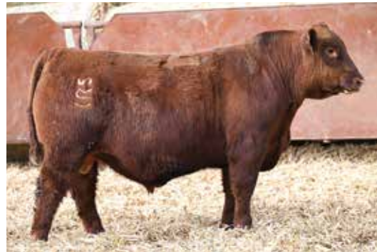
RIDGE RANCH HAND 5103 Maternal Brother to Lots 34 & 35 He Sells as Lot 2