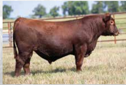
LACY INTRIGUE 082K Sire of Lots 31-33

5L THE REAL DEAL 1687-143B RIDGE SARA 571-1602 RIDGE CASEY 004-571