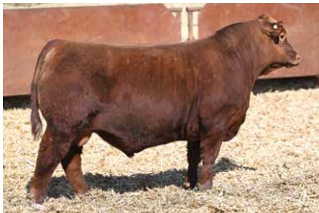
LOT 21 - RIDGE ARNOLD 5019