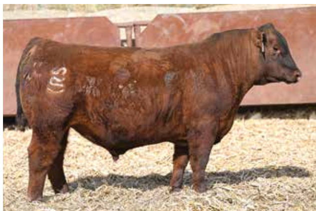
LOT 22 - RIDGE ARNOLD 5014

5L BLOCKADE 2218-30B 3rd Generation Paternal Grandsire of Lots 21-23