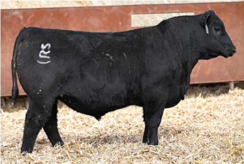
LOT 66 - RIDGE SCALE HOUSE 5117