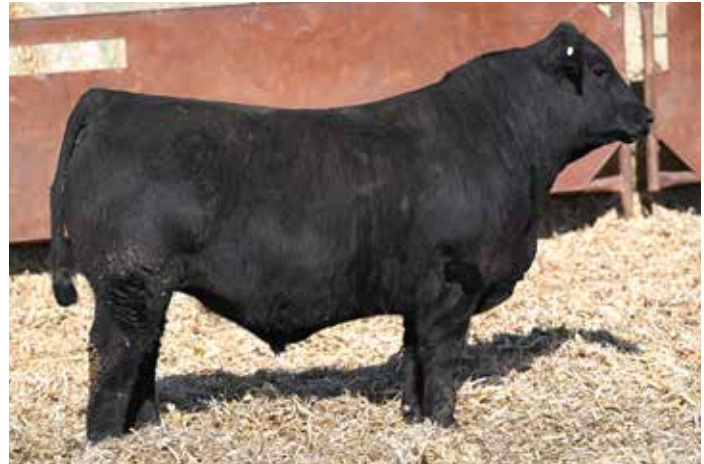
LOT 61 - RIDGE KADOKA 5034