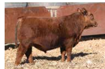
RIDGE VOYAGER 4558 Maternal Brother to Lot 48