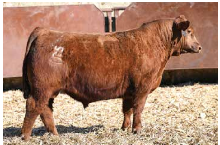
LOT 25 - RIDGE TOPGUN 5132