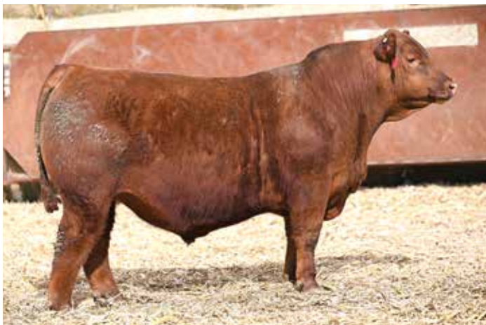
LOT 39 - COOKSLEY TRUE NORTH 524

RIDGE TRUE NORTH 2074 Sire of Lots 39-43