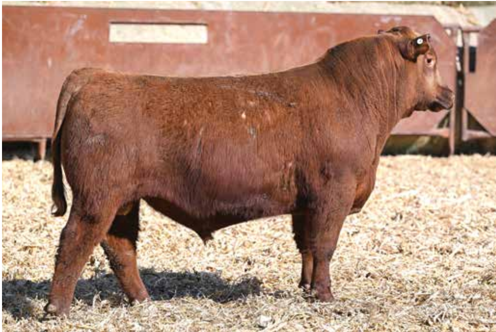
LOT 27 - RIDGE GOLD BAR 5043