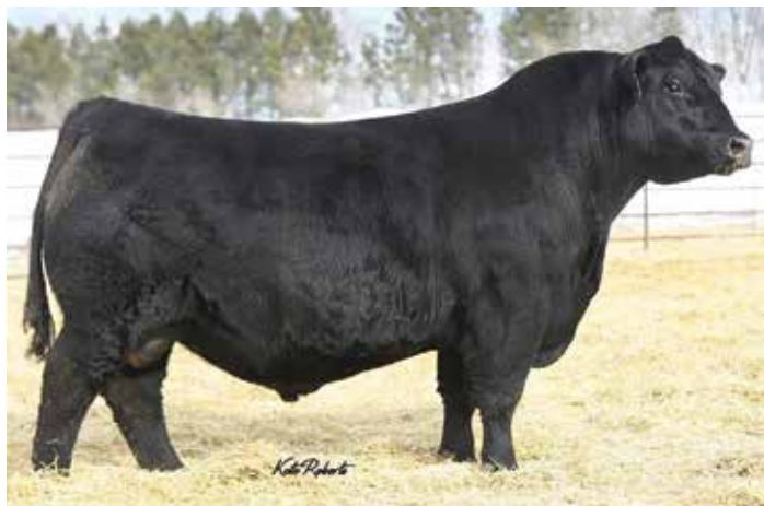
ELLINGSON BADLANDS 0285 - Paternal Grand sire of Lots 57-63