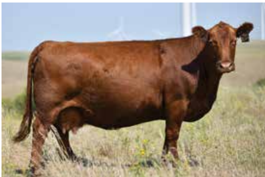
RIDGE TESS 0033-2418 - Maternal Granddam of Lot 106