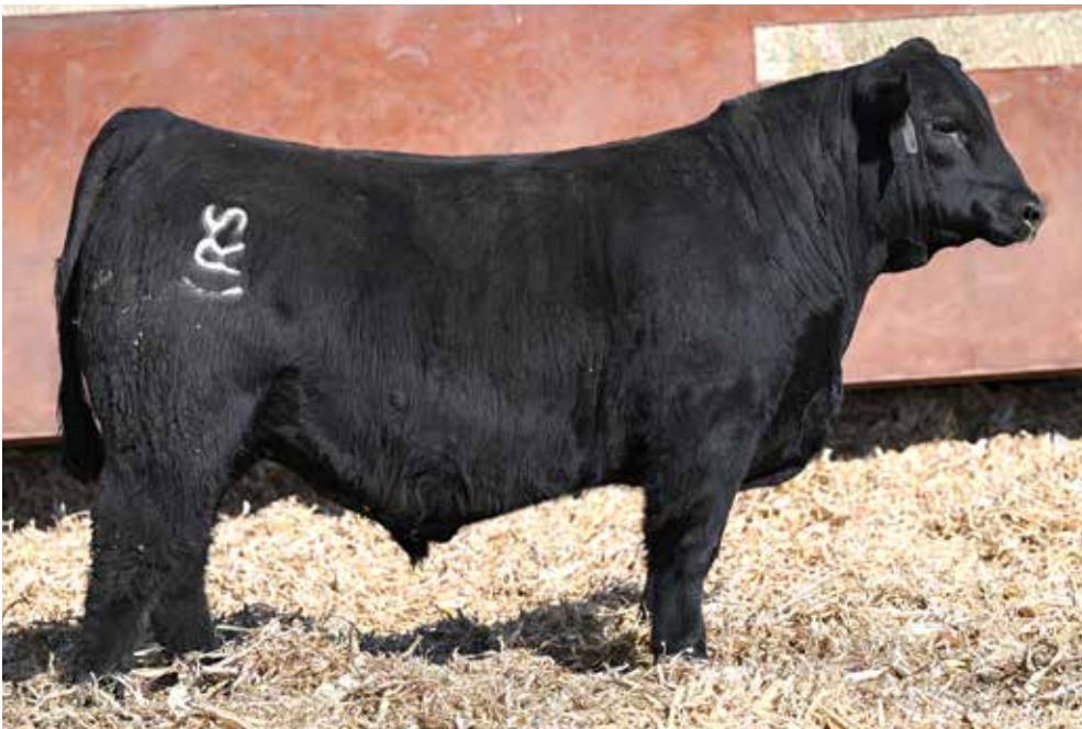
LOT 67 - RIDGE SCALE HOUSE 5119