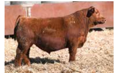
RIDGE END GAME 4521 $36,000 Son of Ridge Sheba 8155-2011