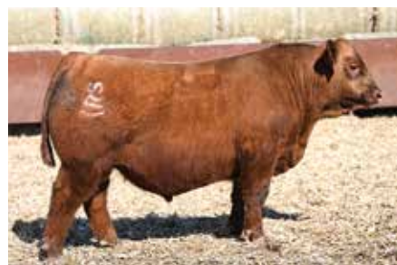
RIDGE DRIFTER 5167 Paternal Brother to Lot 101 He Sells as Lot 4