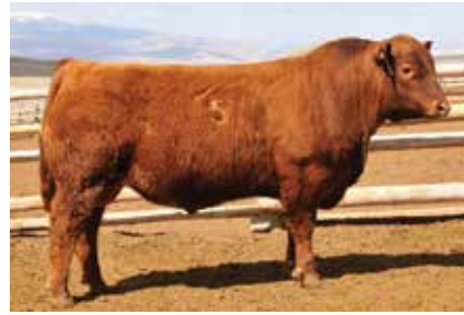
5L BLOCKADE 2218-30B Maternal Grandsire of Lot 110