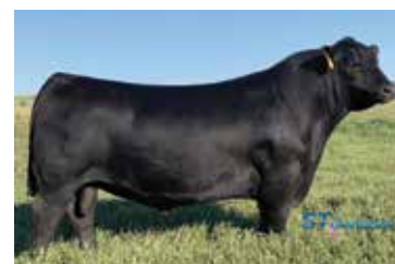
S A V RAINDANCE 6848 Paternal Grand sire of Lot 109