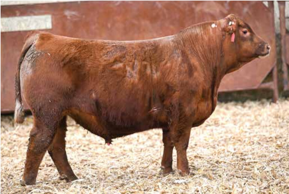
LOT 42 - COOKSLEY TRUE NORTH 528