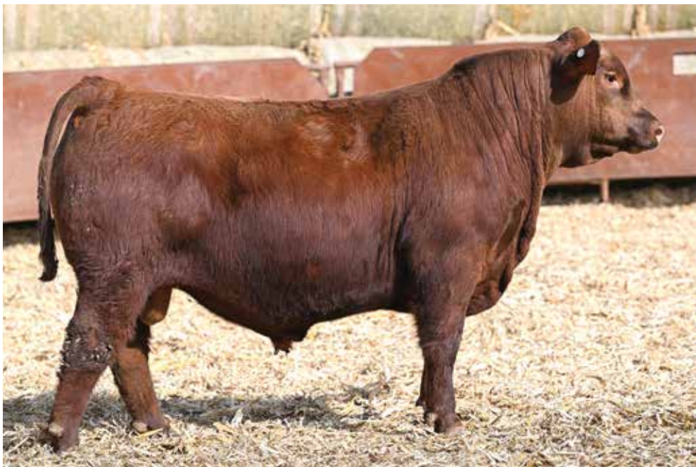
LOT 3 - RIDGE RANCH HAND 5017