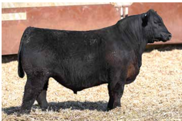
LOT 59 - RIDGE KADOKA 5056