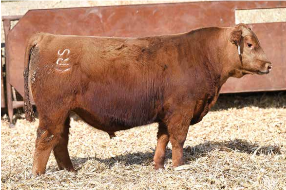
LOT 34 - RIDGE ADONIS 5406