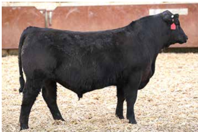
LOT 72 - COOKSLEY TRUE NORTH 515