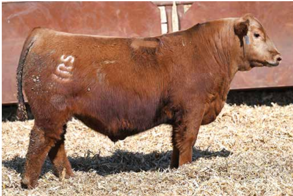
LOT 48 - RIDGE EXILE 5196