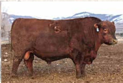
5L BOURNE 117-48A - 3rd Generation Maternal Grandsire of Lots 52 & 53