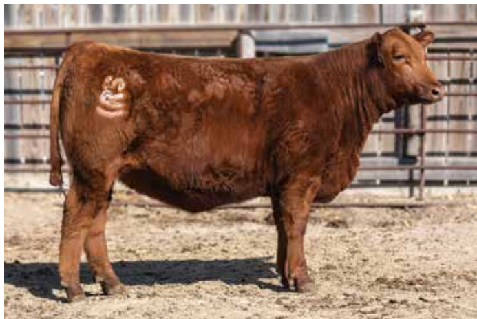
LOT 102 - RIDGE BLOCKANA 0520-5105