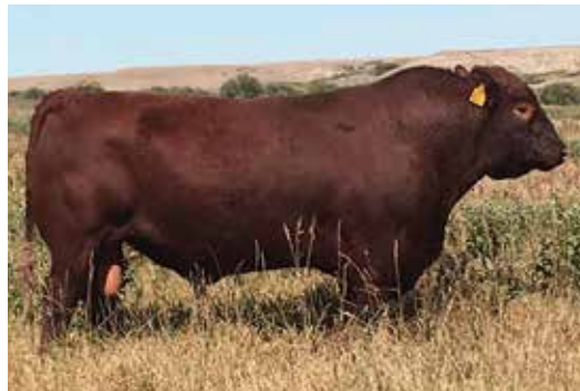
RED FLYING K JULIAN 22A - Sire of Lots 5 & 6