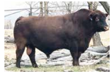
5L FOREMAN 2174-370E Sire of Lots 12-16