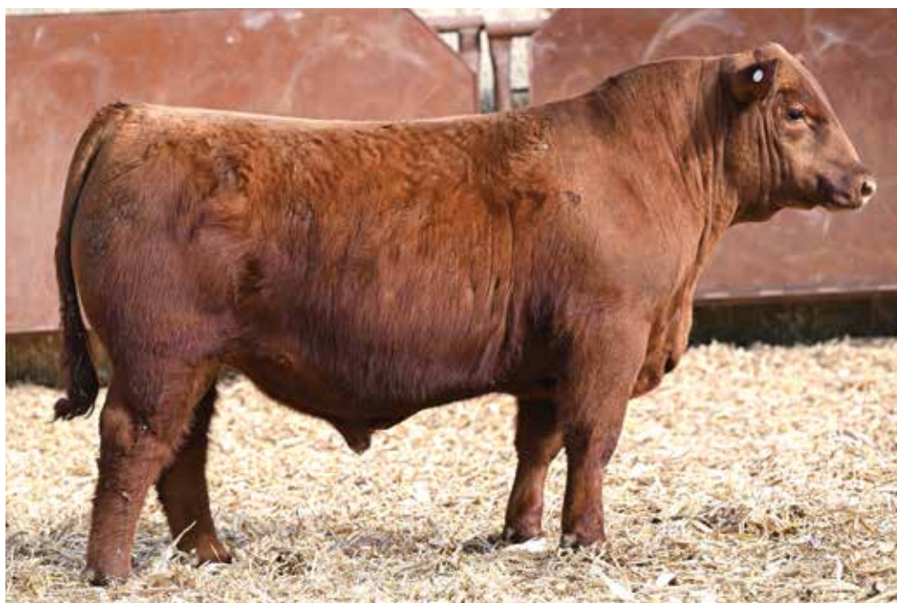
LOT 49 - RIDGE FERDINAND 5552