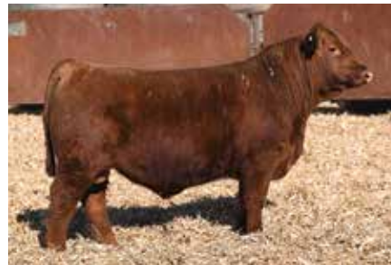
RIDGE RANCH HAND 4515 Maternal Brother to Lot 61