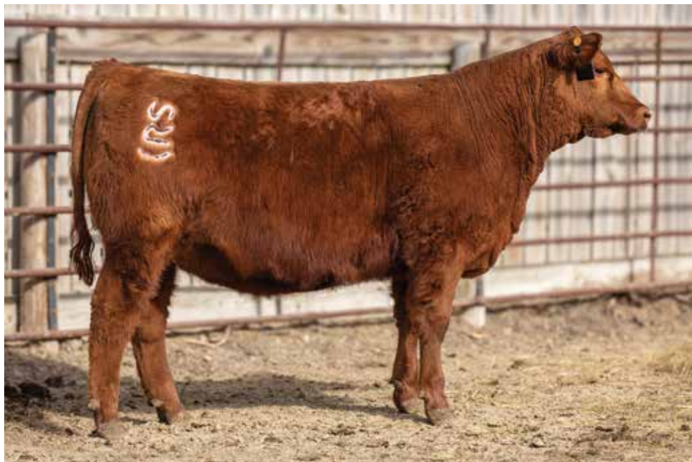
LOT 108 - RIDGE SYBILLI 3386-5160