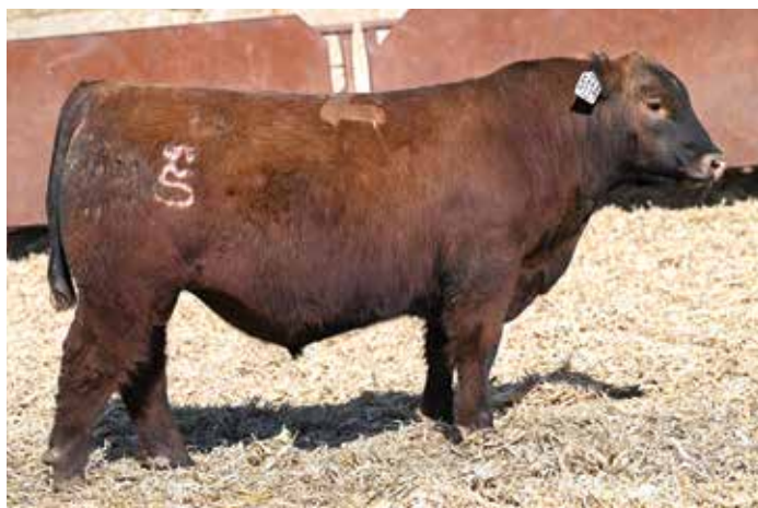
LOT 15 - RIDGE FOREMAN 5549