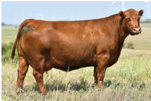
RIDGE 009-8024 - Maternal Granddam of Lot 5