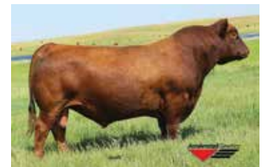
BIEBER SPARTACUS A193 Maternal Grand sire of Lot 51