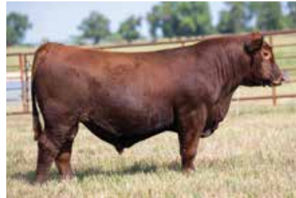
LACY INTRIGUE 082K Sire of Lots 111 & 112