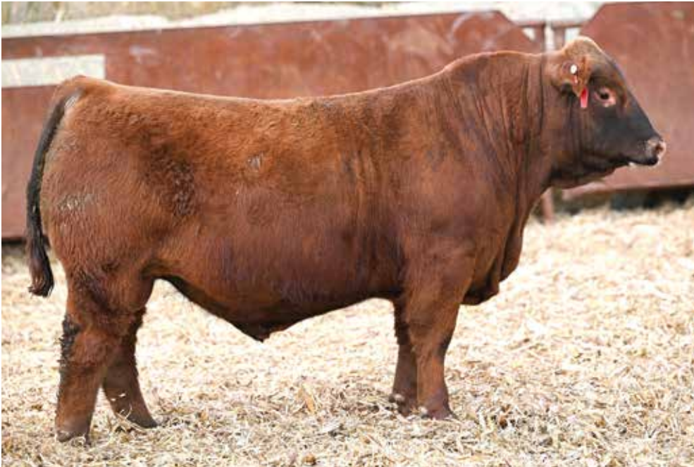
LOT 7 - COOKSLEY JUMP START 505