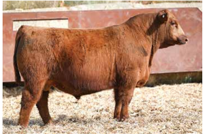
LOT 24 - RIDGE TOPGUN 5092