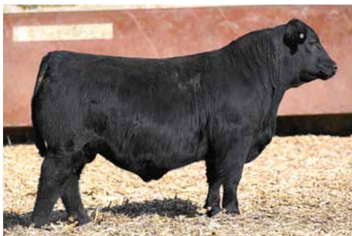
LOT 60 - RIDGE KADOKA 5030