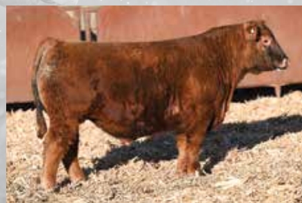
RIDGE QUINDARO 4075 Maternal Brother to Lot 31