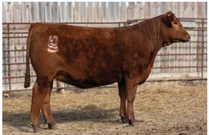
LOT 112 RIDGE SARA 1601-5106