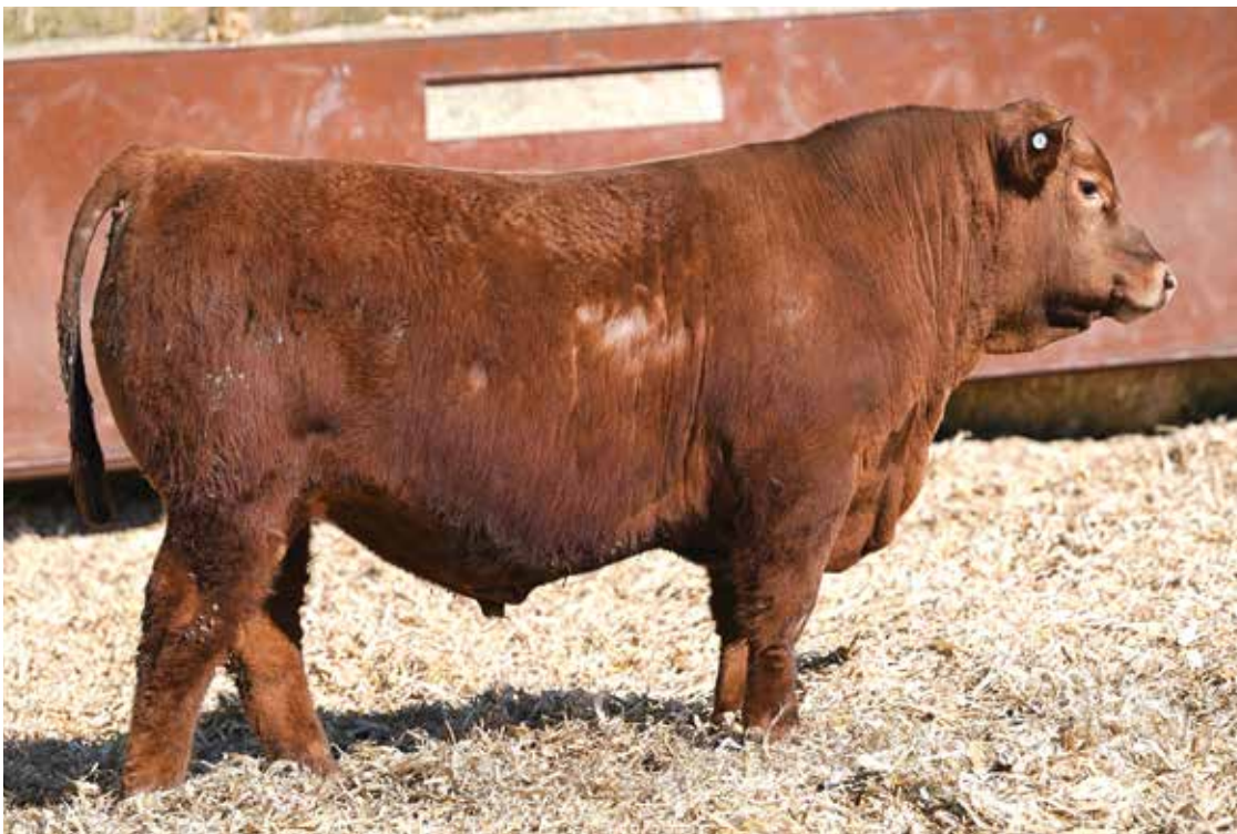
LOT 52 - RIDGE MONTE 5057