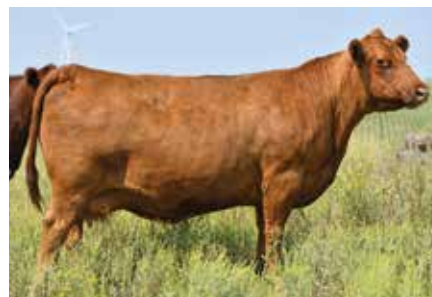
RIDGE LARKABA 742-7151 Maternal Granddam of Lot 61