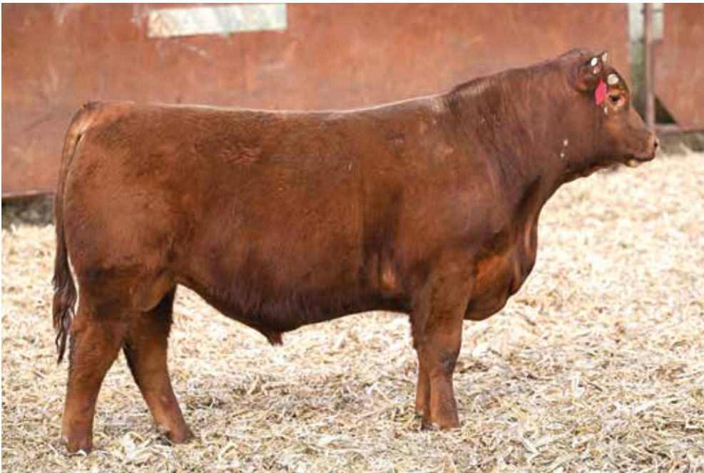
LOT 43 - COOKSLEY TRUE NORTH 522

3rd Generation Maternal Grand sire of Lot 42