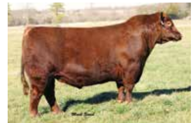
BROWN JYJ REDEMPTION Y1334