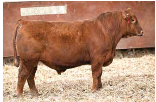
LOT 10 - COOKSLEY JUMPSTART 520