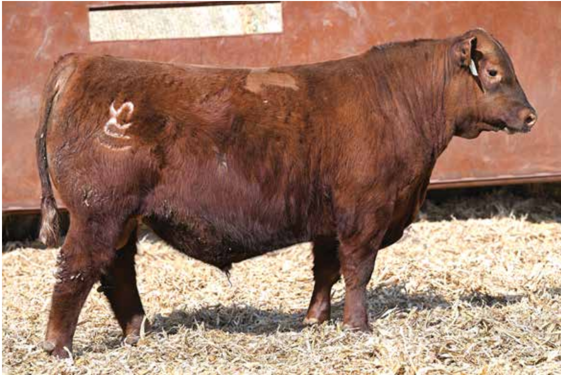
LOT 5 - RIDGE JULIAN 5522