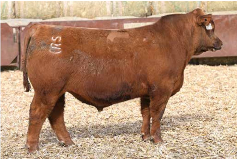
LOT 30 - RIDGE GOLD BAR 5008