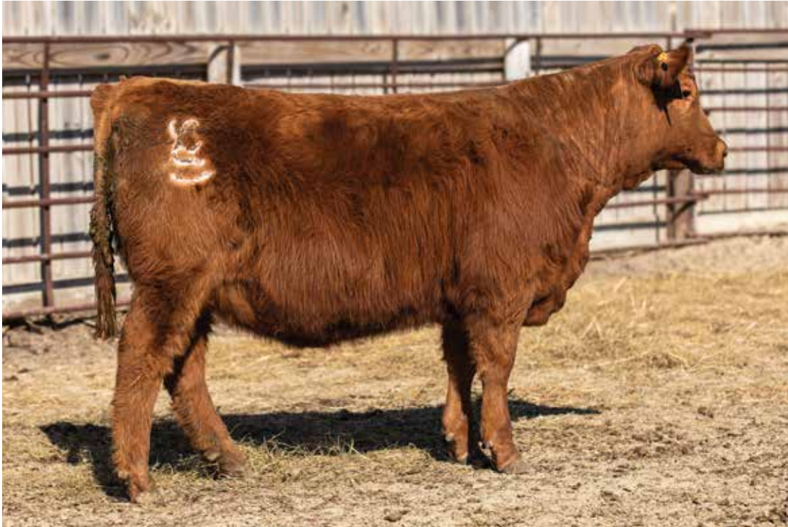
LOT 106 - RIDGE TESS 2106-5202