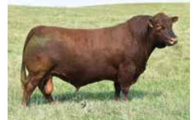
BIEBER ROLLIN DEEP Y118 Maternal Grandsire of Lots 12 & 13