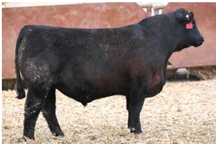
LOT 71 - COOKSLEY TRUE NORTH 523