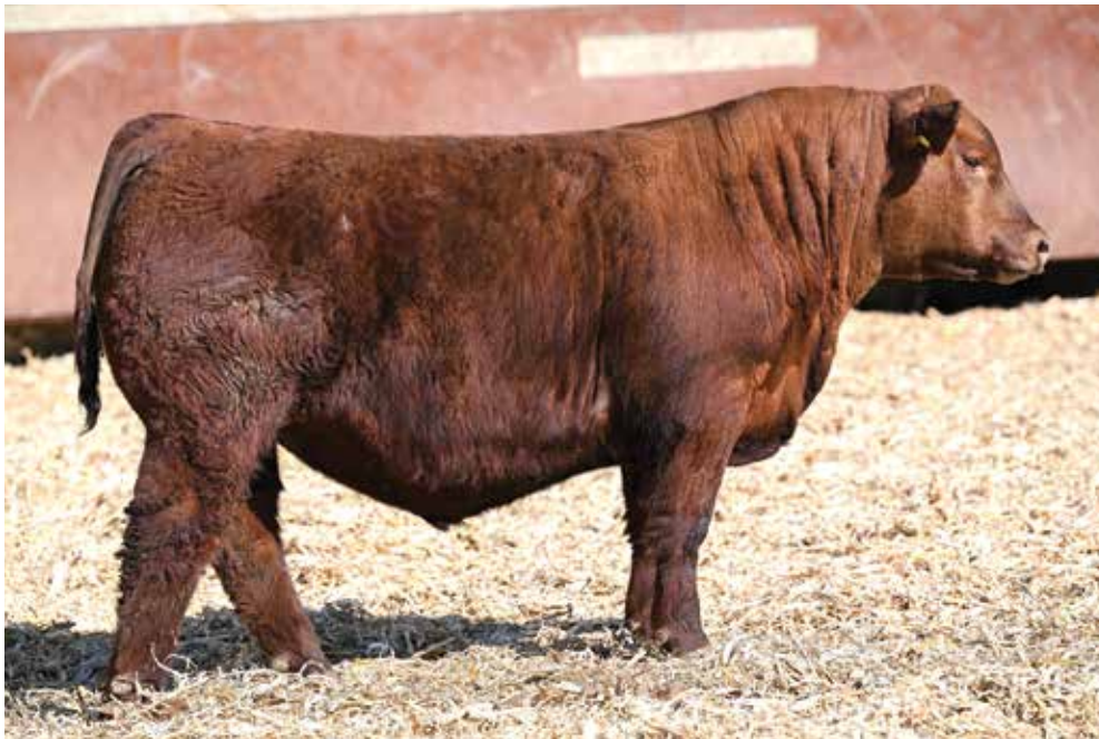
LOT 12 - RIDGE FOREMAN 5404