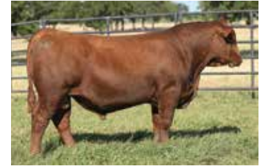
BYU 90G ONE OF A KIND 1415 Sire of Lot 50