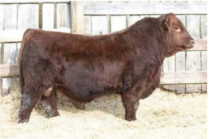
RED LWNBRG EXILE 11K - Sire of Lots 105-107