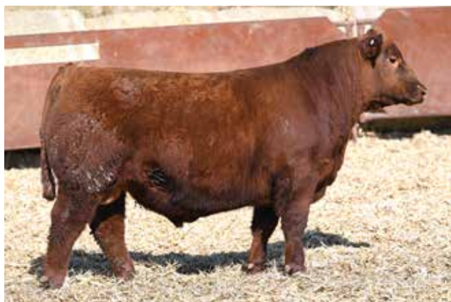
LOT 23 - RIDGE ARNOLD 5038