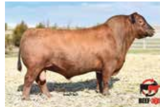
5L LEADING EDGE 15383-117C Maternal Grand sire of Lot 9