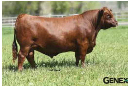
RED U2 MALBEC 195D - Maternal Grand sire of Lot 20