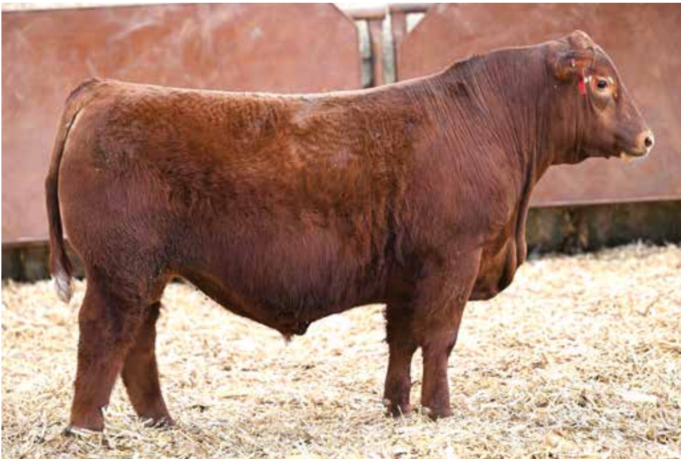
LOT 51 - COOKSLEY RIKI 518