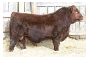
RED LWNBRG EXILE 11K Sire of Lot 48