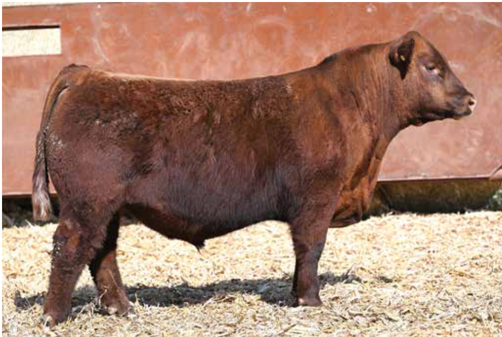
LOT 13 - RIDGE FOREMAN 5409