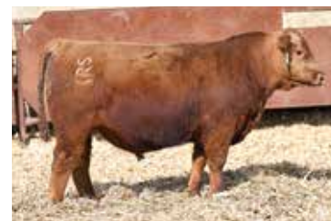
RIDGE ADONIS 5406 Maternal Brother He Sells as Lot 34