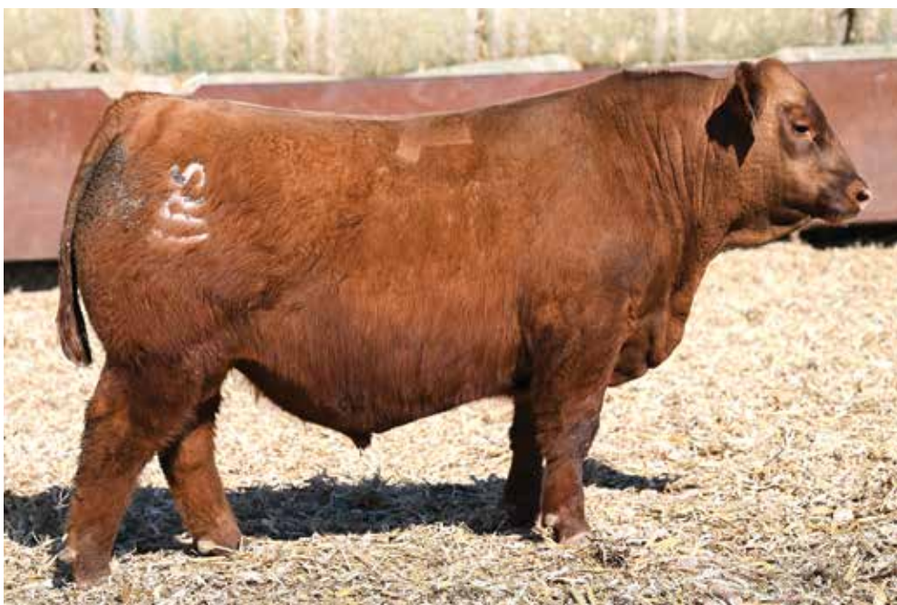
LOT 4 - RIDGE DRIFTER 5167