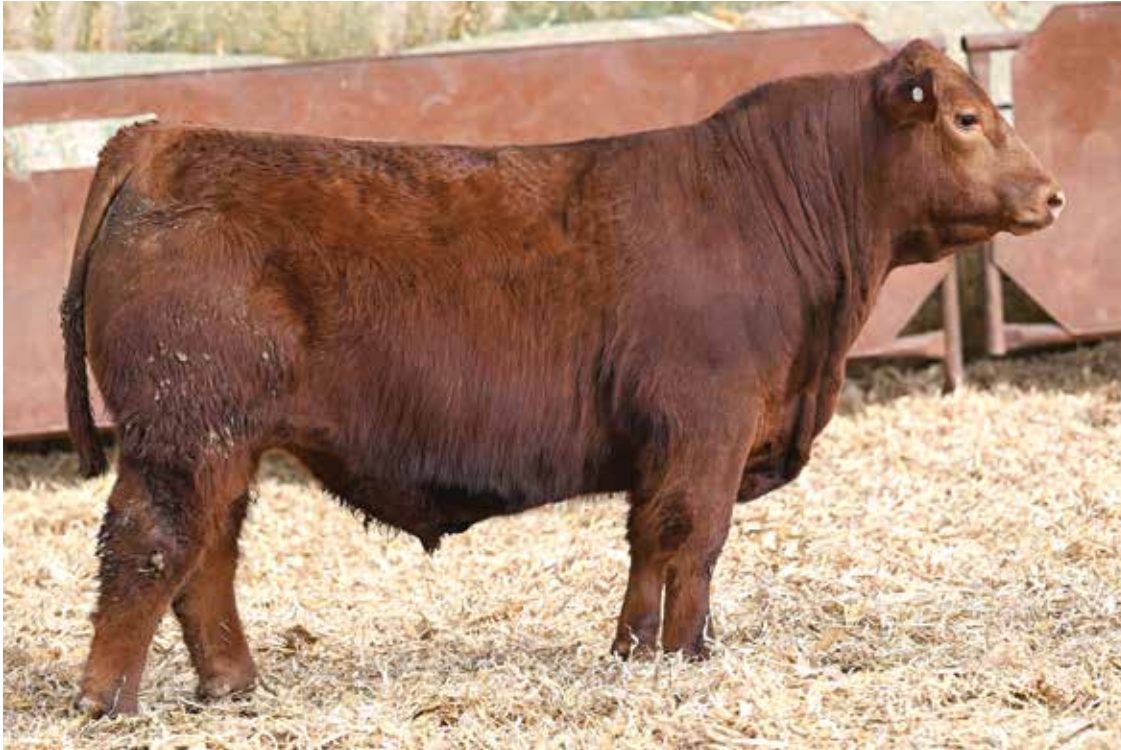
LOT 19 - RIDGE RED BARON 5006