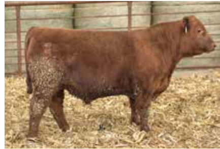
RIDGE TOPGUN 9513 Sire of Lots 24-26