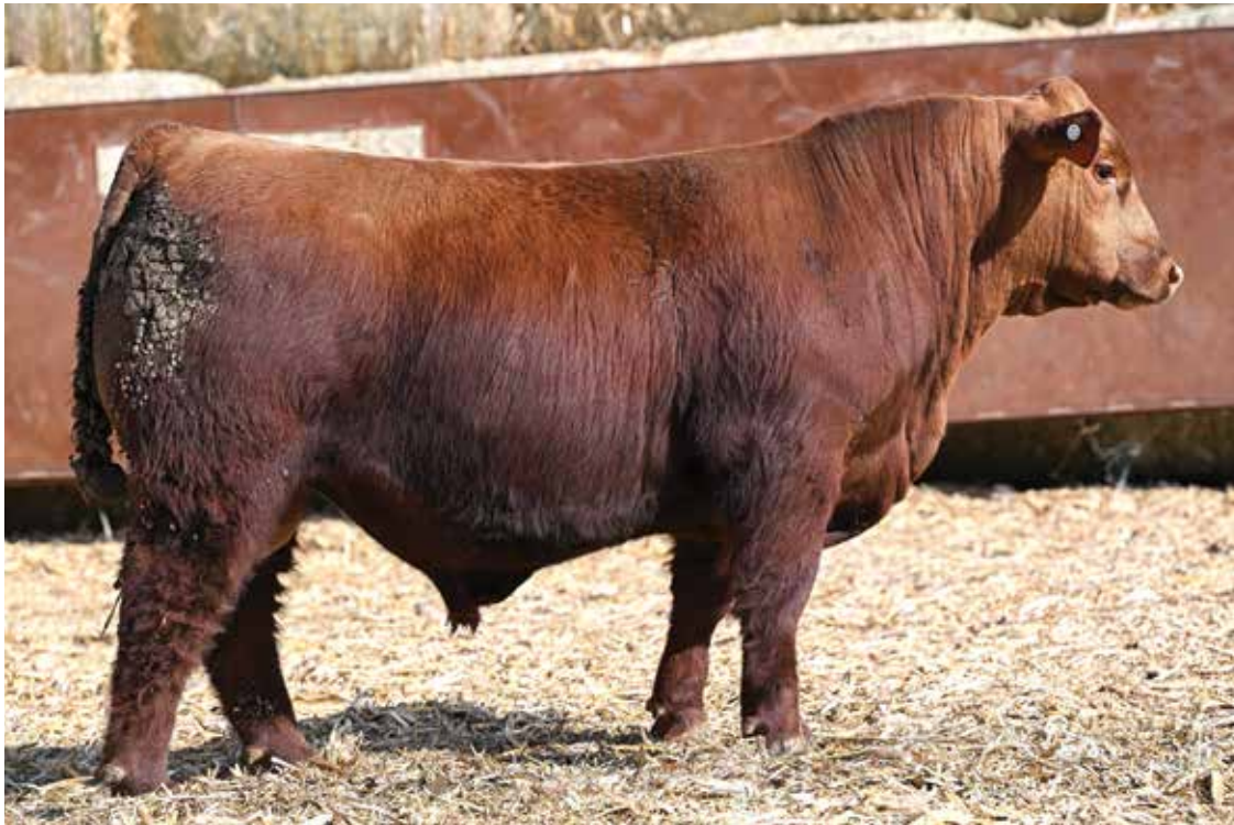
LOT 17 - RIDGE RED BARON 5133