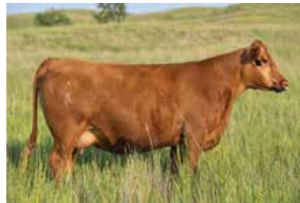
RIDGE TESS 2032-5143 Maternal Granddam of Lot 111