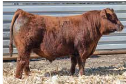
TAC DRIFTER H10 Paternal Grand sire of Lot 101