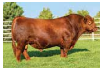
PIE QUARTERBACK 789 3rd Generation Maternal Grand sire of Lot 11