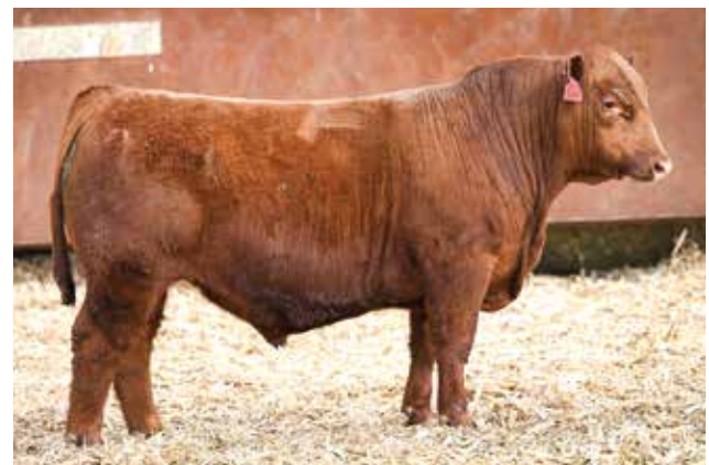
LOT 11 - COOKSLEY JUMPSTART 503