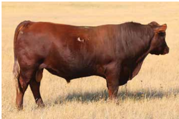
RIDGE PROVISION 6013 Maternal Grand sire of Lot 104