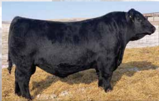
S A V SCALE HOUSE 0845 - Paternal Grand sire of Lots 64-67