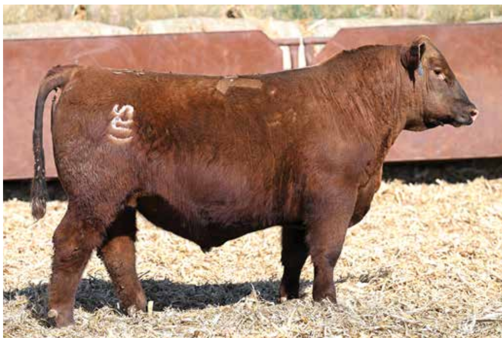
LOT 33 - RIDGE INTRIGUE 5048