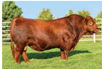
PIE QUARTERBACK 789 3rd Generation Maternal Grandsire of Lot 36