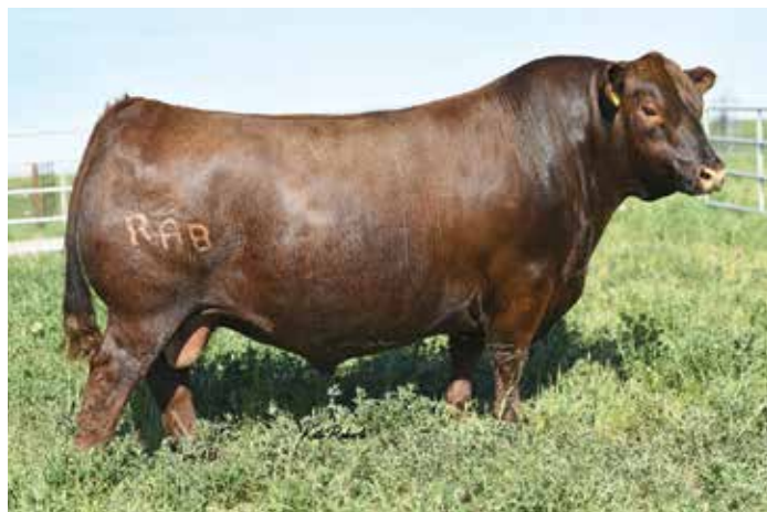
BIEBER CL ENERGIZE F121 - Maternal Grand sire of Lot 114