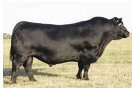
S A V 8180 TRAVELER 004 Maternal Grandsire of Lot 38