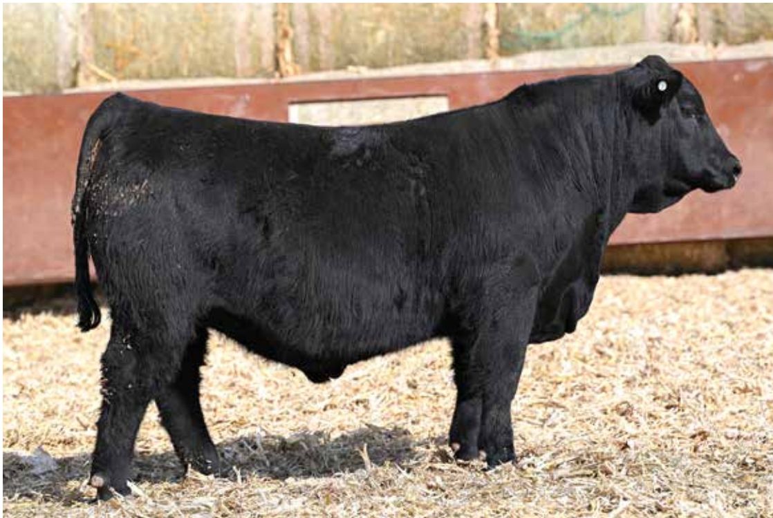
LOT 64 - RIDGE SCALE HOUSE 5069