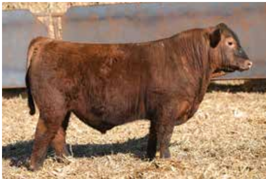
RIDGE AUTHENTIC 3113 - Maternal Brother to Lot 19