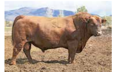
5L ADVANTAGE 3267-221Y Maternal Grandsire of Lot 27