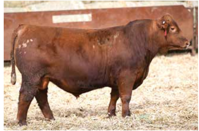
LOT 9 - COOKSLEY JUMPSTART 521