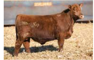
RIDGE MCCANN 3531 Maternal Brother to Lot 66