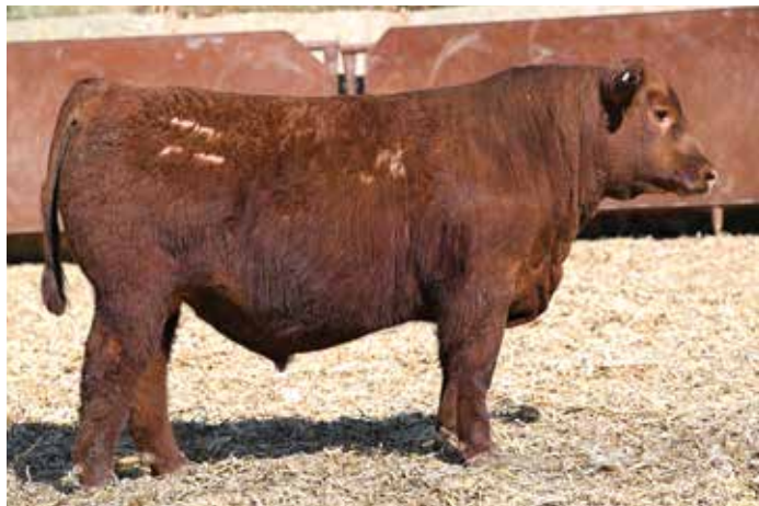
LOT 14 - RIDGE FOREMAN 5528