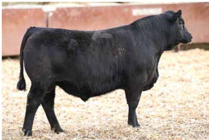
LOT 70 - COOKSLEY TRUE NORTH 529