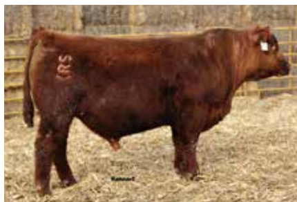
RIDGE COMPASS 7087 Maternal Grand sire of Lot 14