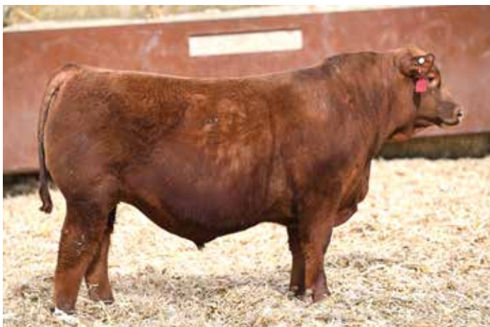
LOT 40 - COOKSLEY TRUE NORTH 526