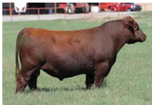
PIE NEW TERRITORY 523 - MATERNAL GRANDSIRE OF LOT 12