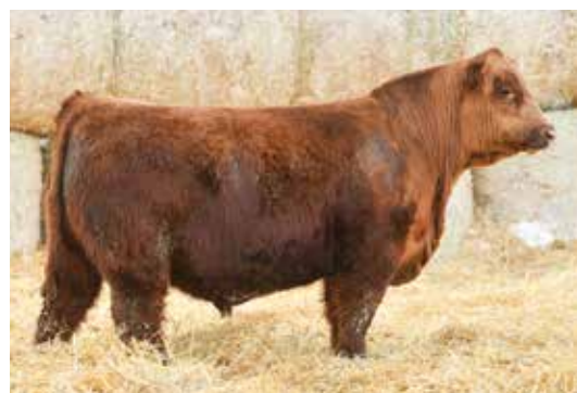
WEBR CHISUM 229 - SIRE OF LOTS 13-16