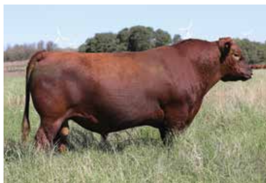
PIE VENTURE 442 - MATERNAL GRANDSIRE OF LOT 52