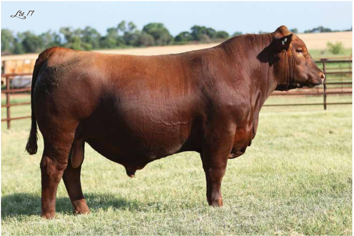
4MC COMPLETE 4222