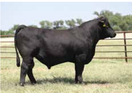
PIE GROUNDBREAKER 2036 SIRE OF LOTS 35-38