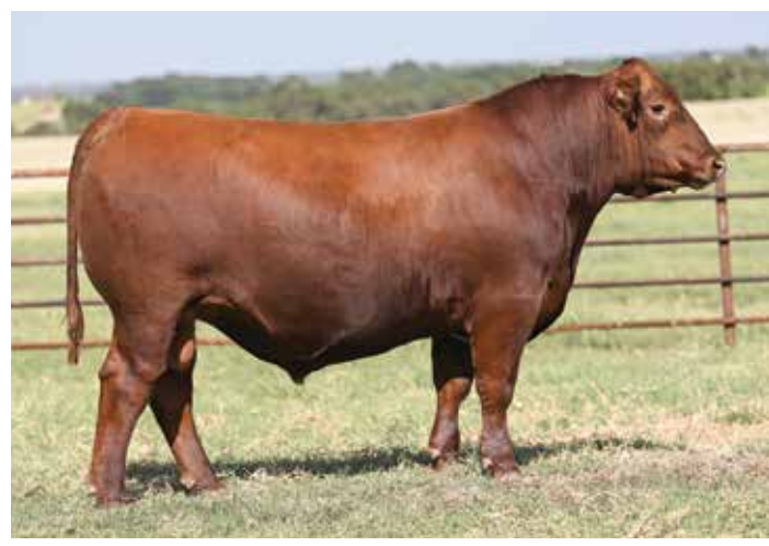
4MC NEW TERRITORY 2234 - MATERNAL BROTHER TO LOT 18