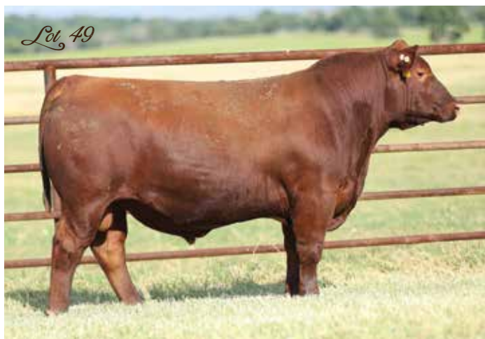
4MC TYCOON 4074

BD: 2/2/24 Reg: 5010845 A - 100% AR Tattoo: 4074