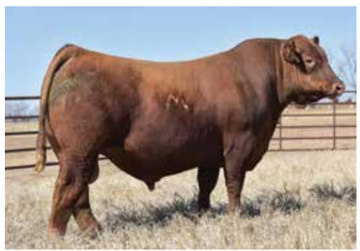
4MC COMPLETE 3224 - MEMBER OF THE "MONU II" COW FAMILY!