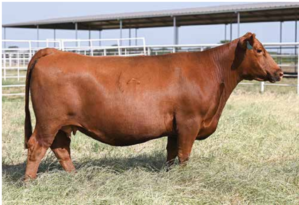
PIE QUEEN 7180 - DAM OF LOT 65