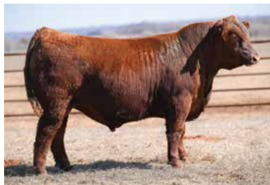
4MC FULLBACK 3027 - MATERNAL BROTHER TO LOT 7