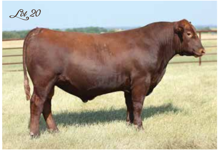
4MC COMPLETE 4012