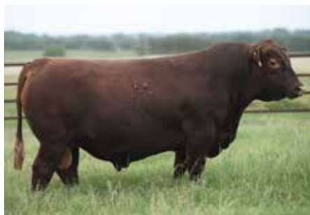
4MC CONVOY 3030

MATERNAL BROTHER TO 3RD GENERATION DAM OF LOT 36