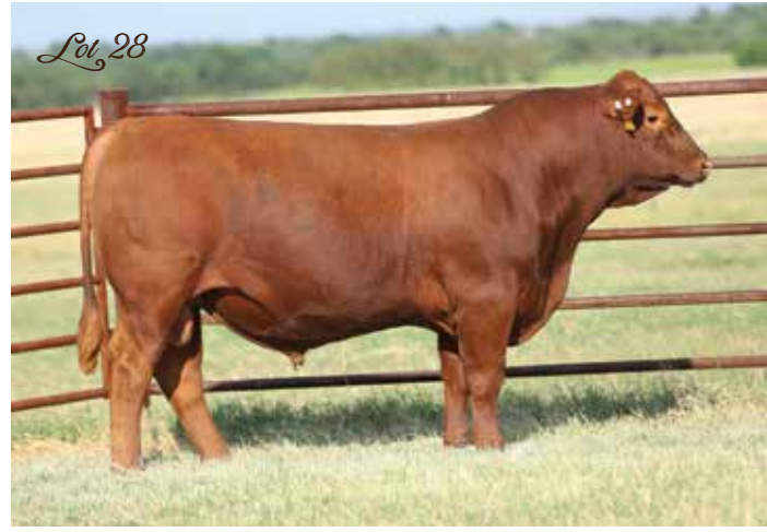
4MC CONVOY 4119

BD: 2/16/24 Reg: 5010927 A - 100% AR Tattoo: 4119 PFFR CONVOY 9Z PIE CONVOY 7058 PIE JULY DALLES 5182 VOS CUB 336-936 VOSS CUB CCR MIS CUB 658-713 HXC CONQUEST 4405P PFFR SUN CAN 8X LSF OPTIMISM 1107Y PIE JULY DALLES 197 CCR CUB 107-518 VOS CHEROK 336 BUF CRK CHEROKEE N009 AKC 658