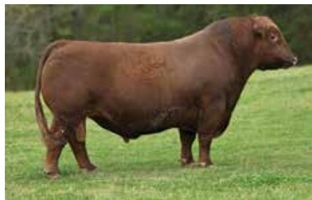
4MC KING OF THE COWBOYS 706 $210,000 PATERNAL GRANDSIRE OF LOT 50