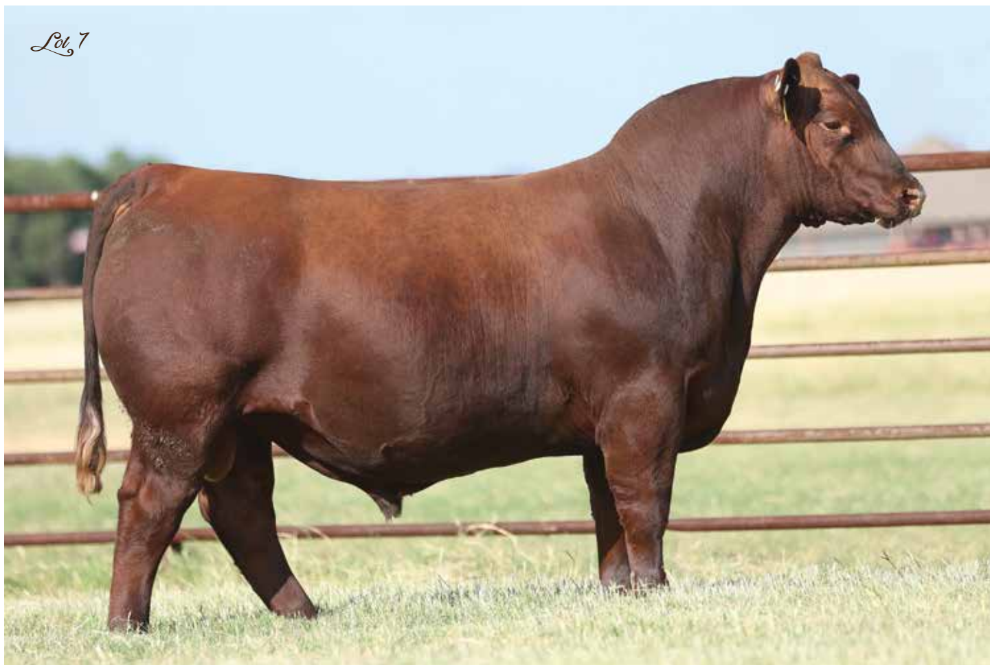
4MC PROWLER SUE 4174