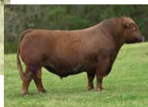
4MC KING OF THE COWBOYS 706 $210,000 MATERNAL GRANDSIRE OF LOT 9