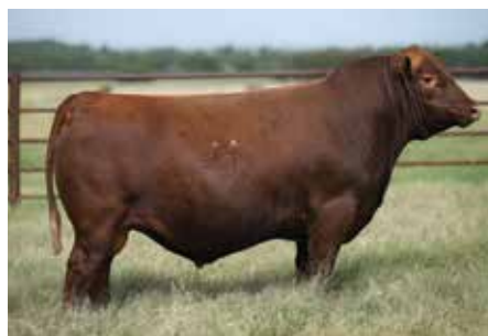
4MC BLOCKOUT 3099 MATERNAL BROTHER TO DAM OF LOT 6