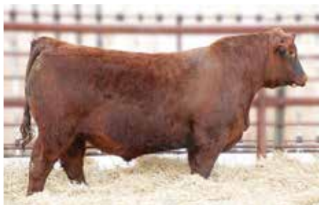
RED SSS TYCOON 225E SIRE OF LOT 49