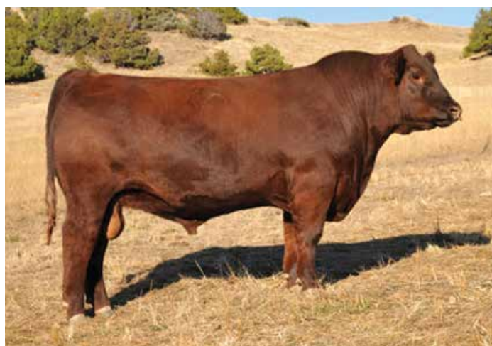
PIE CODE RED 9058 - MATERNAL GRANDSIRE OF LOT 34

BD: 3/20/24 Reg: 5004897 A - 100% AR Tattoo: 4200E