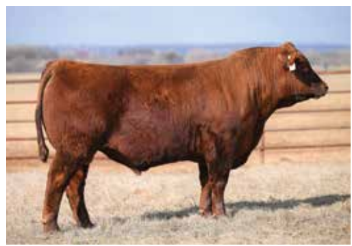
4MC FULLBACK 2297 - MEMBER OF THE "VOSS CUB" COW FAMILY!