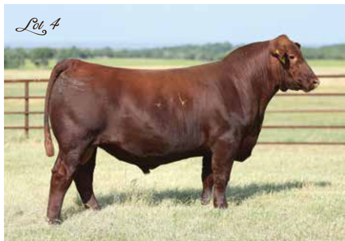
4MC PROWLER 4156