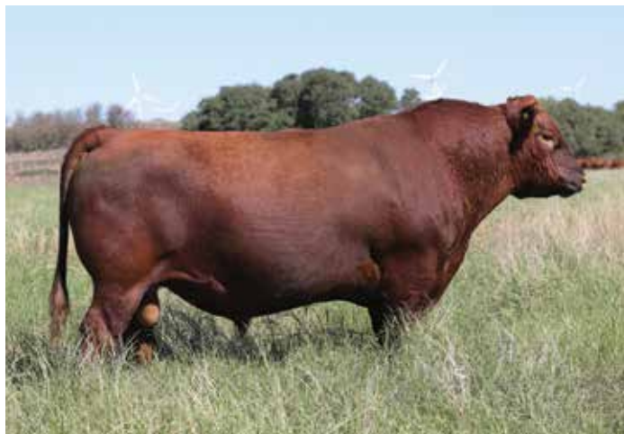
PIE VENTURE 442 - 3RD GENERATION MATERNAL GRANDSIRE OF LOT 41