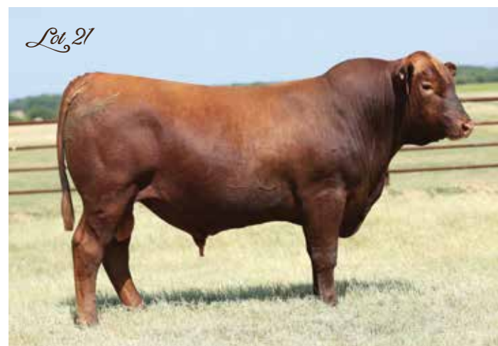
4MC COMPLETE 4127