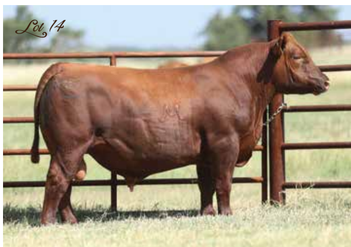
4MC CHISUM 4203

RED MRLA RESOURCE 137E WEBR CHISUM 229 BD: 3/31/24 Reg: 5011075 A - 100% AR Tattoo: 4203 MISS BHR COPPER D 946 PIE SENECA 7213 4MC MASTER AMY 1154 4MC MASTER AMY 5130 MRLA RELOAD 56C MRLA MISS 4422B OHRR DAKOTA COPPER 29K MISS BHR MAJOR MOM'S JR 601 RREDS SENECA 731C PIE ROBIN 3416 RED LAZY MC REDMAN 20X MASTER AMY