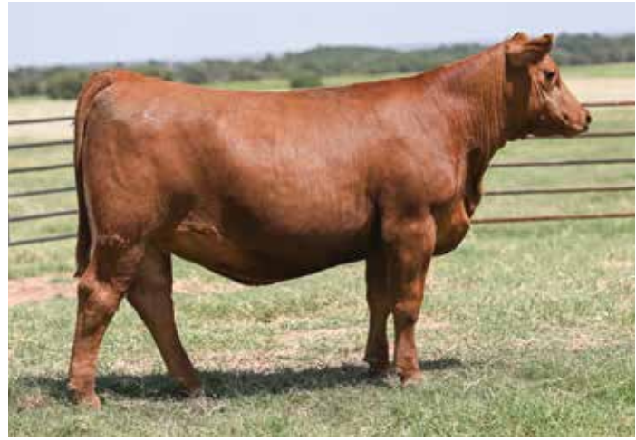
4MC MINOLA 2194 - MATERNAL SISTER TO DAM OF LOT 3