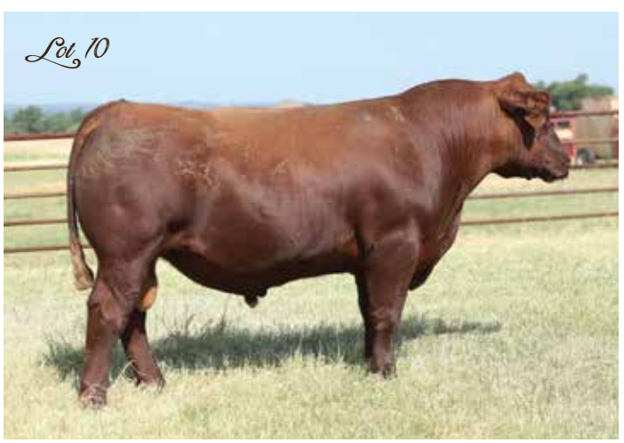
4MC PROWLER 4206