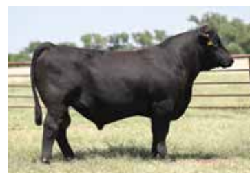
PIE GROUNDBREAKER 2036 - SIRE OF LOT 63