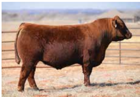
4MC SENECA 2316 MATERNAL BROTHER TO LOT 44