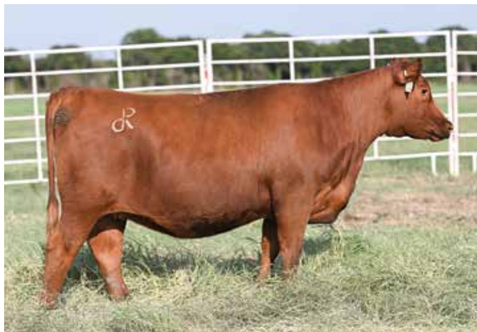
BYU PLAYMATE 2110 - DAM OF LOT 59

DUE TO CALVE 1/18/26 TO PIE CADILLAC 3289 (RAAA: 4865308). LIKELY SAFE AI.