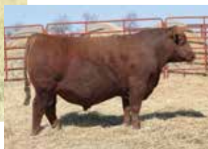
4MC RAMBLER 0180 SIRE OF LOT 48