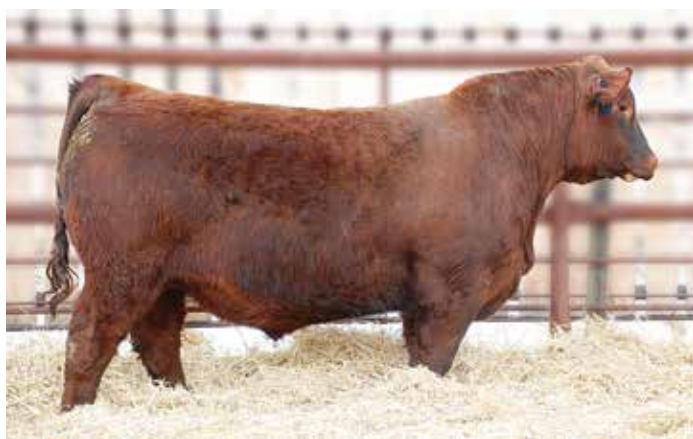
RED SSS TYCOON 225E - SIRE OF LOT 59

DUE TO CALVE 3/1/26 TO PIE EXACTLY 4101 (RAAA: 5025605), HRP BOULEVARD 4132M (RAAA: 4944024), OR HRP MAXIMUS 3084L (RAAA: 4822879).