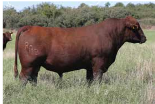
BIEBER FUSION C194 - SIRE OF LOTS 31-34