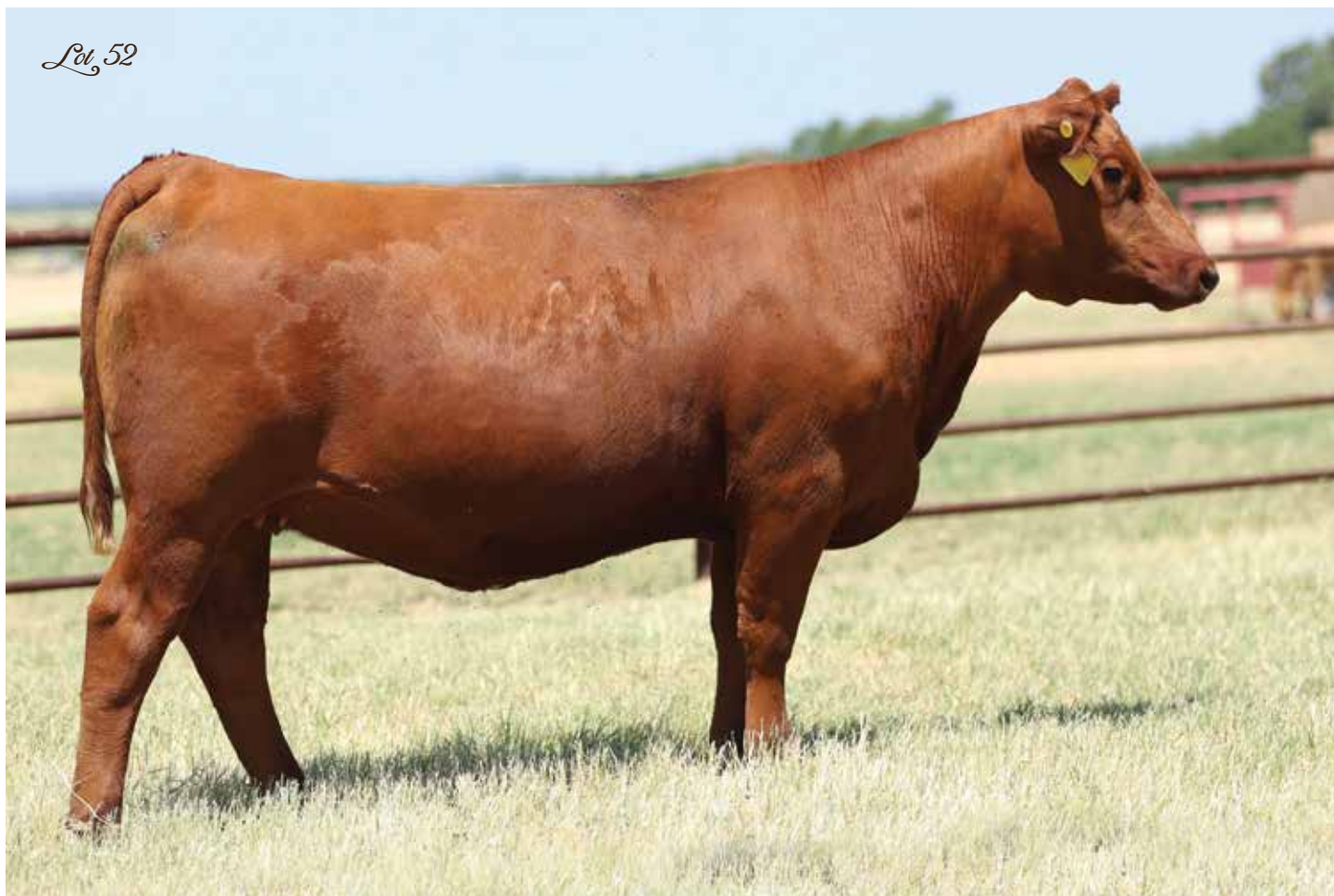
4MC DAISE RED 4084