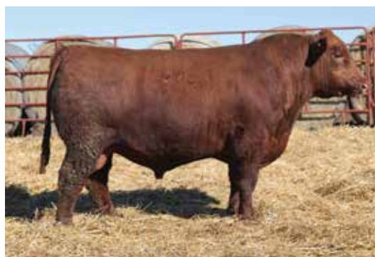
4MC BLOCKOUT 966 - MATERNAL BROTHER TO DAM OF LOT 15