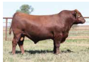
PIE COMPLETE 1668 - SIRE OF LOT 62