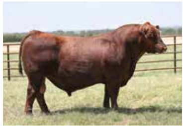
WEBR PROWLER J61 SIRE OF LOTS 56 & 57