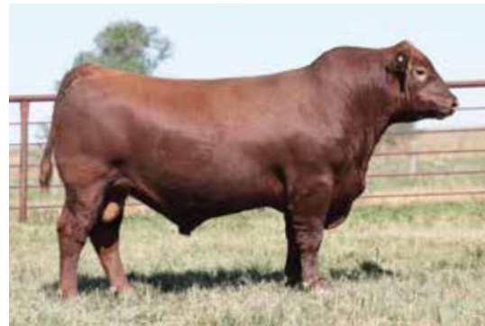
PIE COMPLETE 1668 - SIRE OF LOTS 17-25