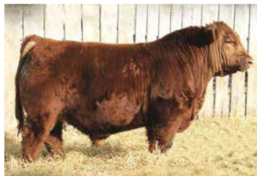
RED MRLA RESOURCE 137E - PATERNAL GRANDSIRE OF LOTS 13-16

MRLA RELOAD 56C MRLA MISS 4422B OHRR DAKOTA COPPER 29K MISS BHR MAJOR MOM'S JR 601 5L BLOCKADE 2218-30B C-BAR ISABEL 513C 4MC SAGA 575 C-BAR TILLY U861