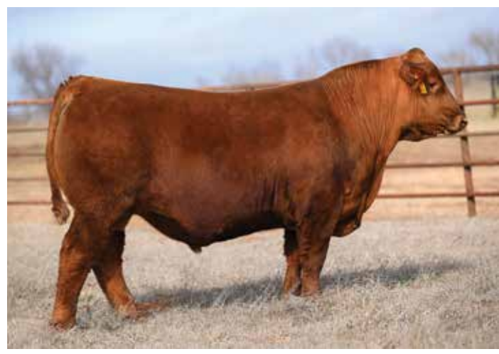
4MC QUARTERBACK 2278E - MATERNAL BROTHER TO LOT 19