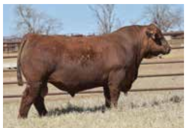
4MC COMPLETE 3271 MEMBER OF THE "GOLDI" COW FAMILY!