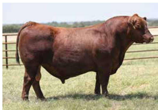
WEBR PROWLER J61 - SIRE OF LOTS 1-12

RED SIX MILE BRANDO 666C WEBR PROWLER J61 BD: 3/15/24 Reg: 5011047 B - 99.8% AR Tattoo: 4184 WEBR DALLAS 633 PIE NEW TERRITORY 523 4MC BRASKA 702 4MC BRASKA 5125 HCG BRANDING IRON RED SSS BARMAID 301Z BIEBER ROLLIN DEEP Y118 WEBR DALLAS 1253 ANDRAS NEW DIRECTION R240 PIE CENTENNIAL FORTUNE 3330 PIE THE COWBOY KIND 343 SOR BRASKA FI T870