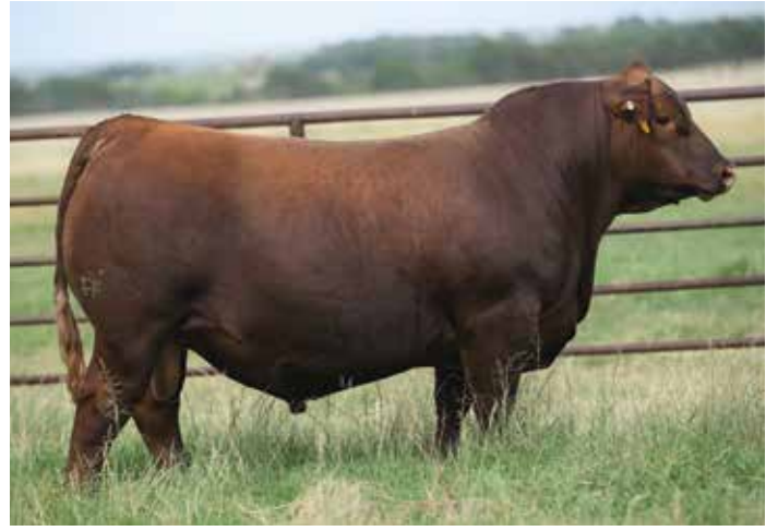
4MC PROWLER 3190 - 3/4 BROTHER IN BLOOD TO LOT 2