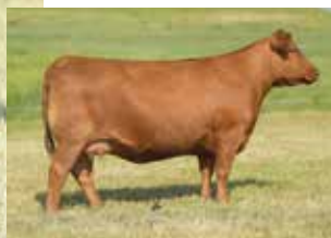
C-BAR STONY 502C PATERNAL GRANDDAM OF LOT 47