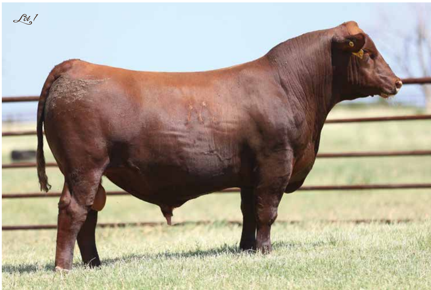
4MC PROWLER 4184