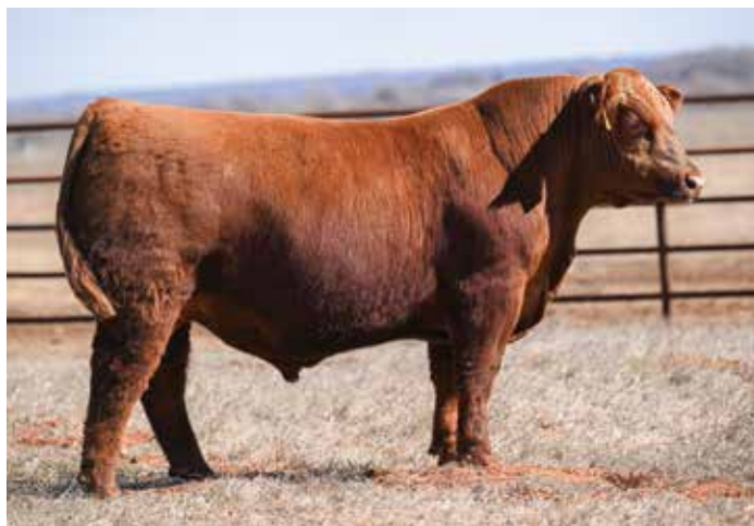
4MC STRONG SIDE 3040 - MATERNAL BROTHER TO LOT 40