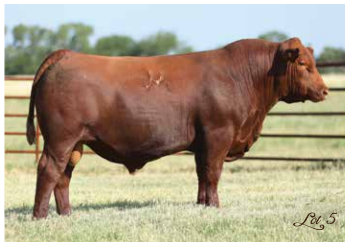
4MC PROWLER 4142