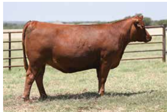
4MC BOTEET 2003 - MATERNAL SISTER TO LOT 17