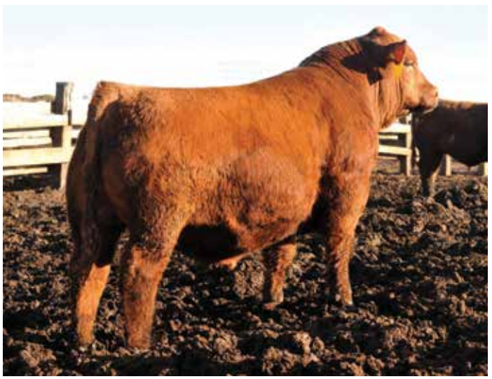
9 MILE BLOCKOUT 7102 - MATERNAL GRANDSIRE OF LOT 12