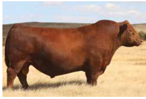
KJL/CLZB COMPLETE 7000E - $190,000 PATERNAL GRANDSIRE OF LOTS 17-25