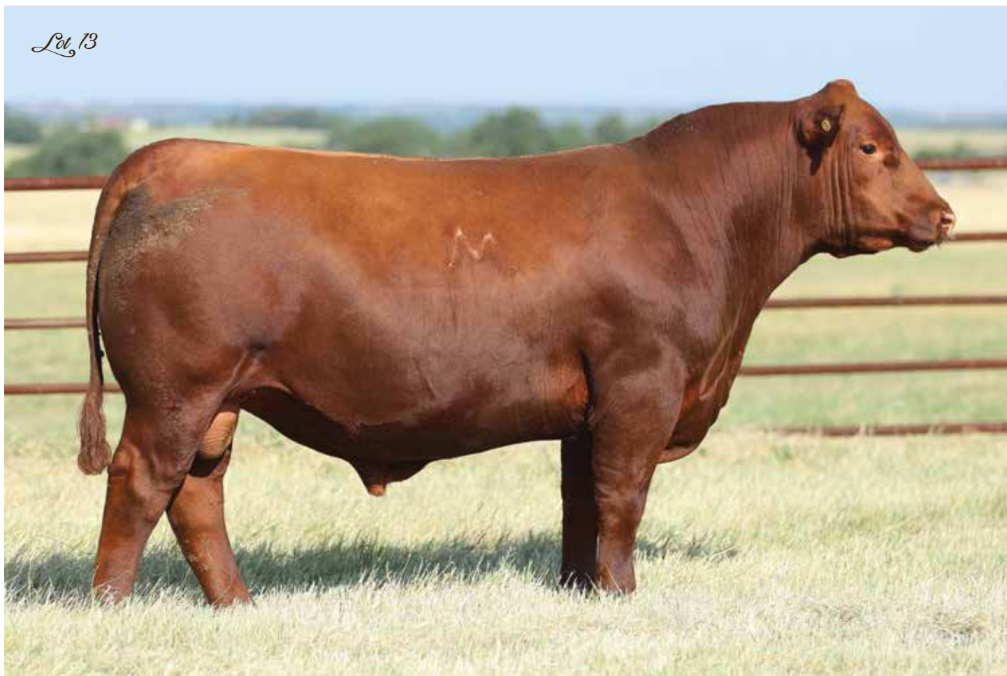
4MC CHISUM 4213