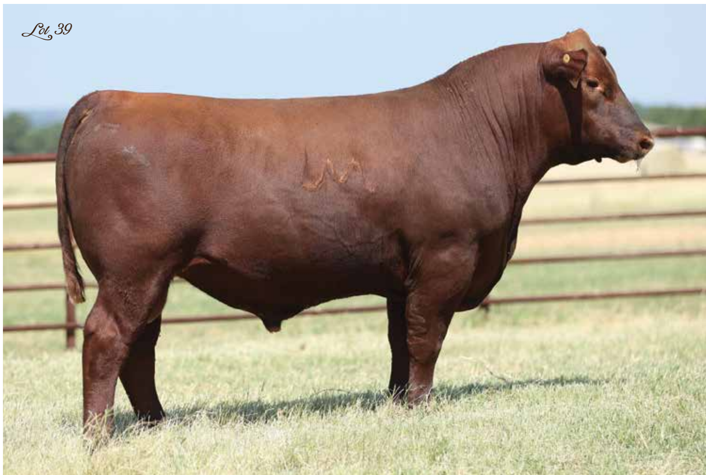
4MC FULLBACK 4151