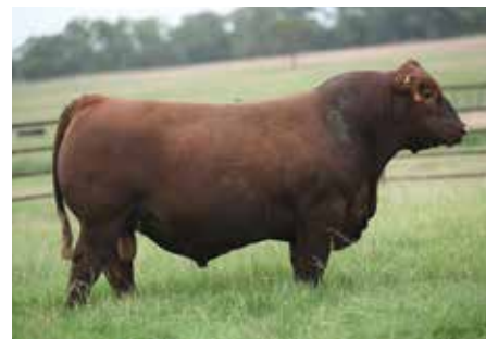
4MC BLOCKOUT 324 FULL BROTHER TO LOT 46