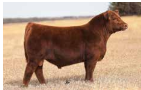
SIX MILE PARABELLUM 675G SIRE OF LOT 51