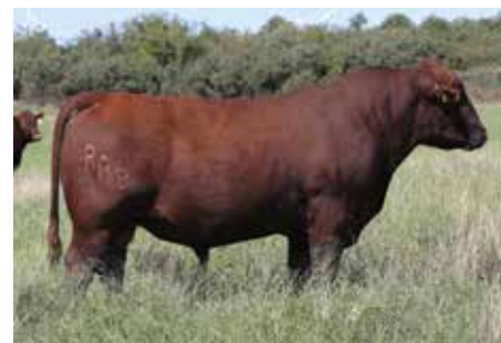
BIEBER FUSION C194