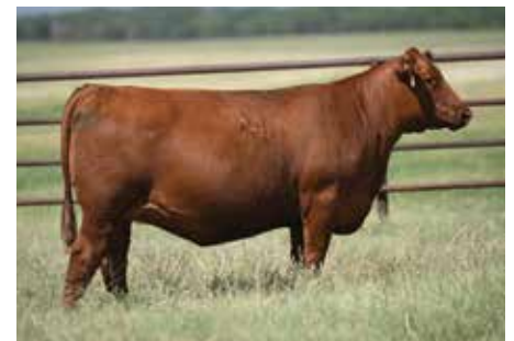
4MC BOTEET 3165E FULL SISTER TO DAM OF LOT 35