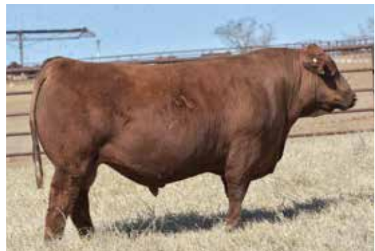
4MC RAMBLER L33 - SON OF FULL SISTER TO DAM OF LOTS 31-33