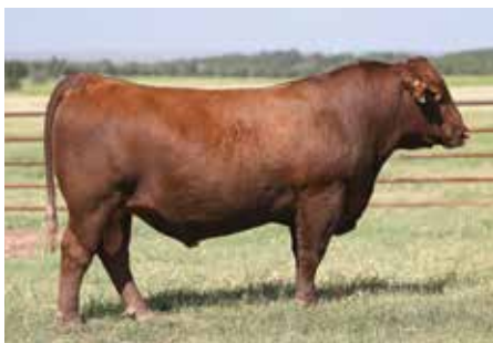
4MC FUSION 2100

MATERNAL BROTHER TO 3RD GENERATION DAM OF LOT 36