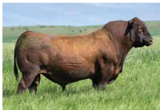
RED SIX MILE BRANDO 666C - PATERNAL GRANDSIRE OF LOTS 1-12