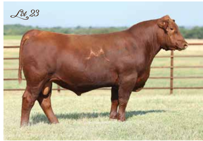
4MC COMPLETE 4223

LEACHMAN PLEDGE A282Z HXC 507C LSF SAGA 1040Y TPIE EMERALD 7121 BUF CRK THE RIGHT KIND U199 PIE CASCADE 561 LSF OPTIMISM 1107Y PIE MS PRECISION 0352