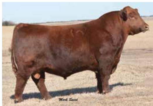
PIE THE COWBOY KIND 343 - $75,000 MATERNAL GRANDSIRE OF LOT 39