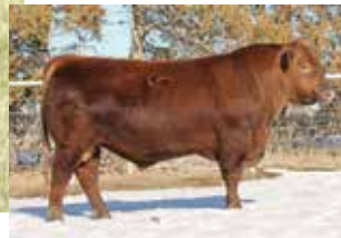
LSF SAGA 1040Y MATERNAL GRANDSIRE OF LOT 8