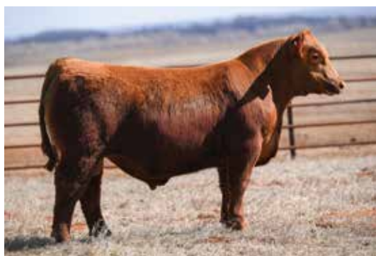
4MC KING OF THE COWBOYS 3005 - MATERNAL BROTHER TO LOT 14