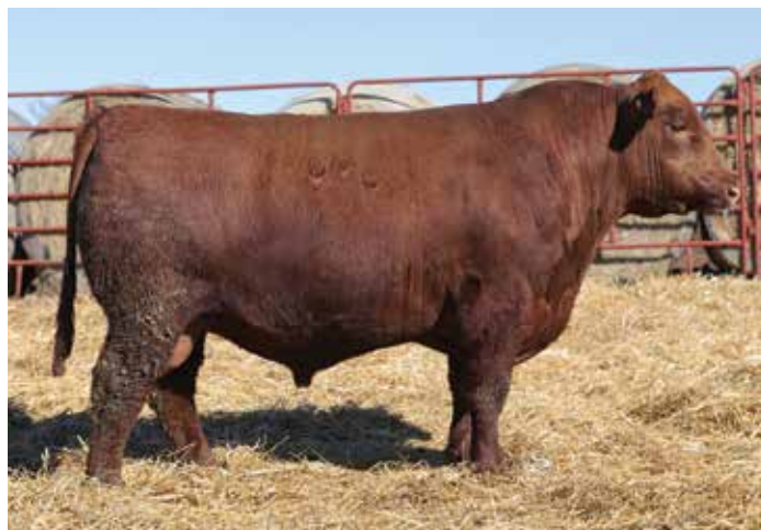
4MC BLOCKOUT 966 - MATERNAL BROTHER TO LOT 26