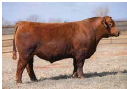
4MC 301 BLOCKOUT FULL BROTHER TO LOT 45