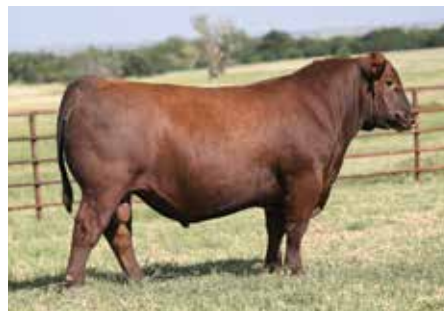
4MC KING OF THE COWBOYS 2112 FULL BROTHER TO DAM OF LOT 35