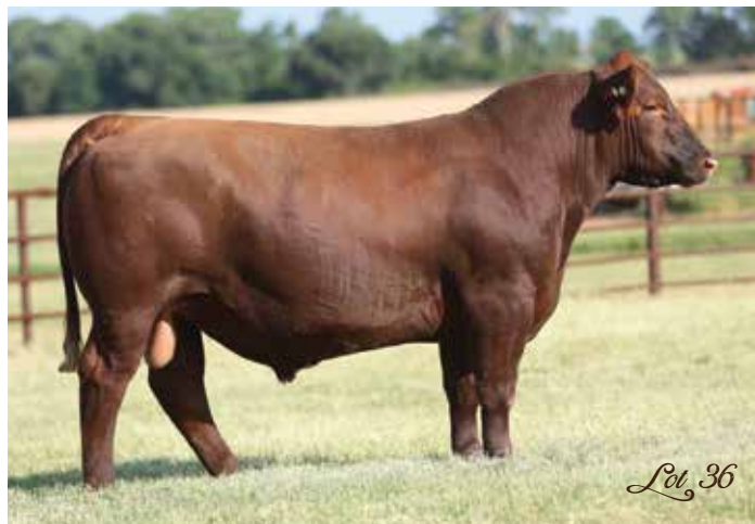
4MC REM GROUNDBREAKER 4031

CONNELY CONFIDENCE PLUS BROWN MS MISSION STMT B542 PIE QUARTERBACK 789 PIE POTEET 7149 PIE FULLBACK 7005 PIE STORMY 541 AHL FLASHBACK 446B HLH MS RIGHT KIND 0172 4157