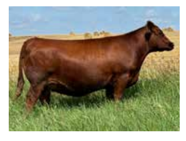
C-BAR ABIGRACE 7104E Dam of Lot 2