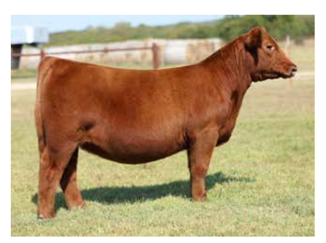
WD LADY DRIVEN 450 ET $49,500 Full Sister to Lot 102 Embryos