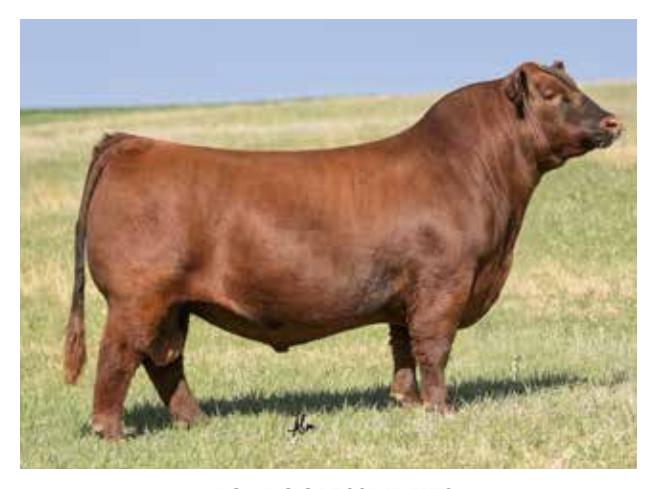
NIO PROGRESSIVE 1179 Sire of Lot 101 Embryos