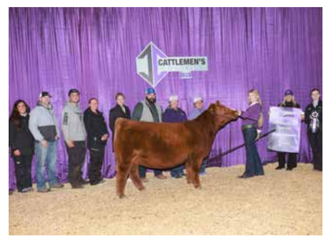
WD LADY DRIVEN 450 ET 2025 Cattlemen's Congress Division Champion Red Angus Heifer