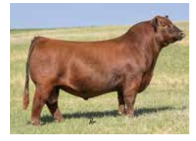
NIO PROGRESSIVE 1179 Sire of Lots 2-7