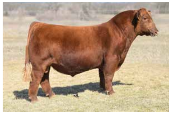
WD EXTRA 271 Full Brother to Lot 1 & Maternal Brother to Lots 3-7