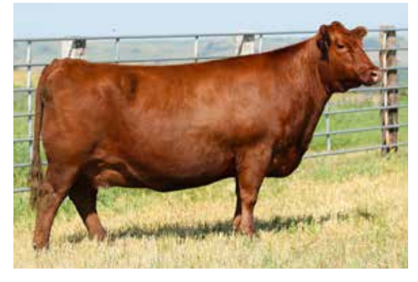
WCR MISS KURUBA DE 2085Z Paternal Grandam of Lots 2-7