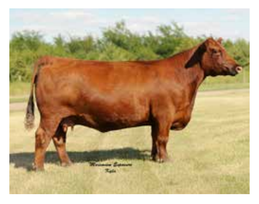
GT CITA 4060 Legendary Maternal Granddam of Lot 8