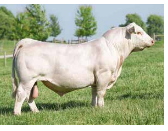
BOY OUTLIER 812 ET PLD Maternal Grandsire of Lot 10