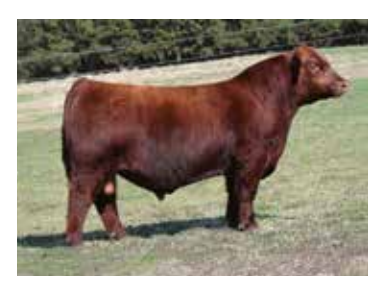
EGL GCC RED EAGLE E7194 Sire of Lot 1