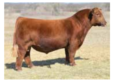
WD EXTRA 271 Full Brother to Lot 1 & Maternal Brother to Lots 3-7