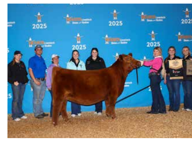
WD LADY DRIVEN 450 ET 2025 HLSR Grand Champion Open Red Angus Hefer