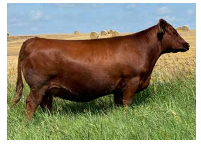
C-BAR ABIGRACE 7104E Dam of Lot 101 Embryos