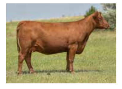
C-BAR MIMI 8134F Dam of Lots 1 & 3-7