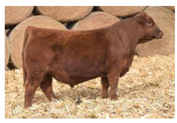
ROSE WDRST APEX 272 Sie of Lot 9