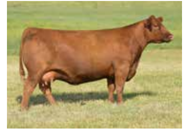
C-BAR MISS MIMI 458B Maternal Granddam of Lots 1 & 3-7