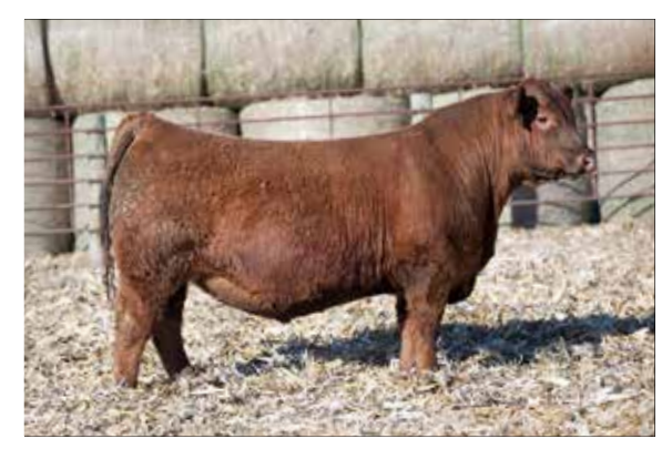
SHAG RED LABEL 120 Sire of Lot 8

• SELLING 100% POSSESSION AND 2/3 SEMEN INTEREST.