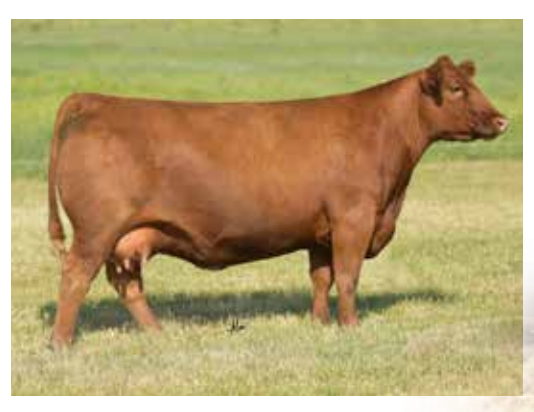
C-BAR MISS MIMI 458B Maternal Granddam of Lots 1 & 3-7