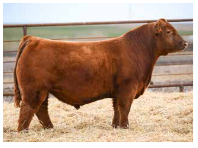
WD ROBUST 406 ET Full Brother to Lot 101 Embryos - He sells as Lot 2!