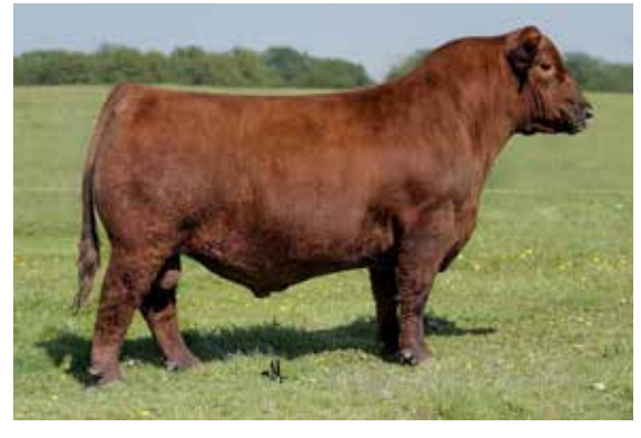
MANN PINNACLE 712 Paternal Grandsire of Lot 9