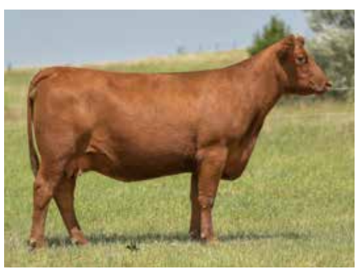
C-BAR MIMI 8134F Dam of Lots 1 & 3-7