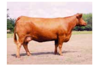
BROWN MS ABIGRACE L7730 $1 Million+ Producing Matriarch of the "Abigrace" Cow Family!