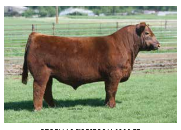
PZC TMAS FIRESTORM 1800 ET Popular AI Sire Maternal Brother to Dam of Lot 8