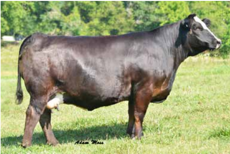
PRS SPRING VELVET X126 MATERNAL GRANDDAM OF LOT 21