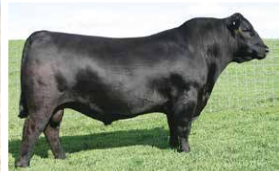
S A V BISMARCK 5682 MATERNAL GRANDSIRE OF LOT 4