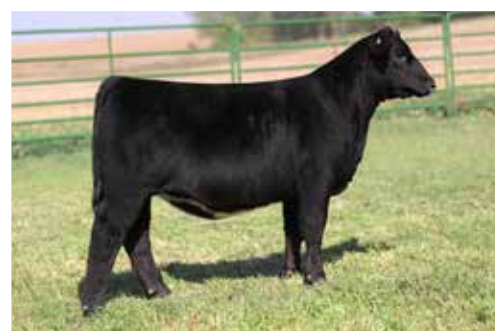
HLTS ORANGE CRUSH L93 MATERNAL SISTER TO LOT 57-59