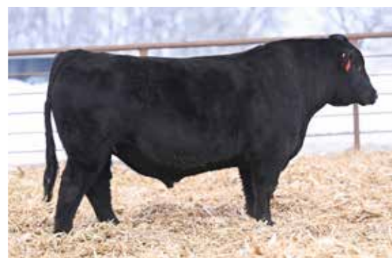
HLTS MAINLINE J267 MATERNAL BROTHER TO LOT 9

• M31 is very balanced from both a phenotype and numeric standpoint, and we think he is a complete and logical option for a cattleman or woman that needs a herd bull that will sire both feeder cattle and replacements with added value, and has the build of longevity to be a long-term investment towards bettering the cowherd.