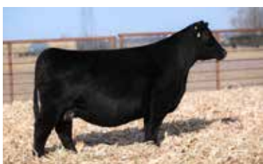
TDD HAVEN 0610 DAM OF LOT 32