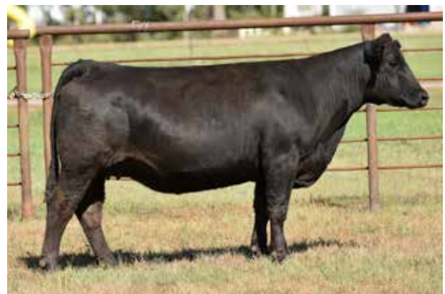
HLTS MS. EPIC G946 MATERNAL SISTER TO LOT 63