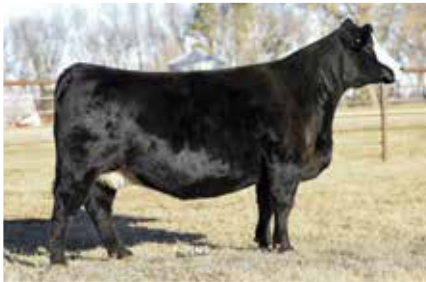
HF CORA 58C DAM OF LOT 61