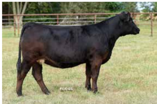
HLTS MISS ORDER G1729 DAM OF LOT 29-30