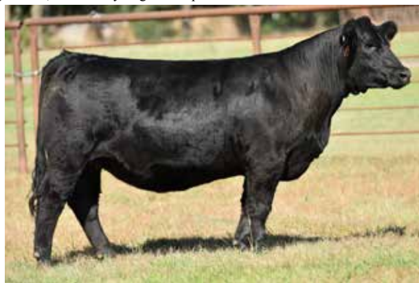
HLTS CRUSH H067 MATERNAL SISTER TO LOT 57-59