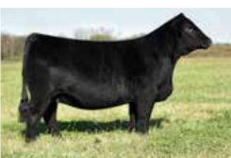
WLE SHEZ IT C056 DAM OF LOT 11