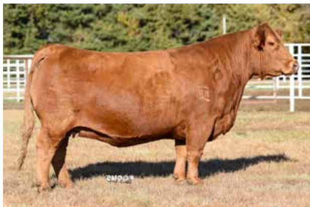
HPF ORANGE CRUSH A378 DAM OF LOT 57-59

K252 CALVED 1/26/25. BLACK BLAZED BULL CALF BY ZTGC JUST CUZ 52K (4063644). TAG N60. 80LBS.