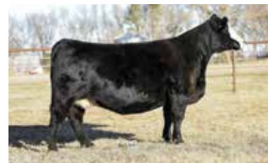
HF CORA 58C DAM OF LOT 8