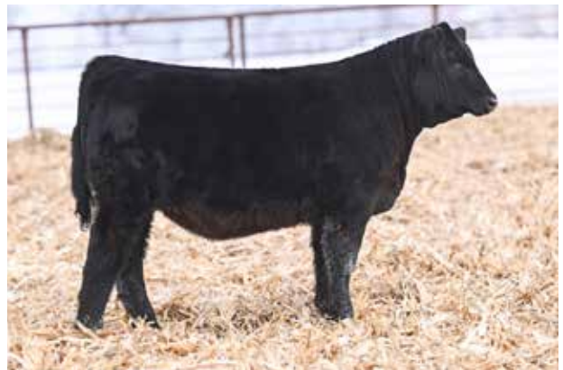
RSSF QUEEN SUPREME K209 FULL SISTER TO LOT 52 & 53

• They both come carrying exciting purebred matings to the $147,500, WINC All Right 213K.