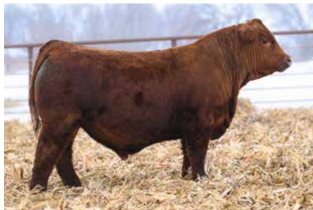
HLTS FORT HAYES L21 MATERNAL BROTHER TO DAM OF LOT 22