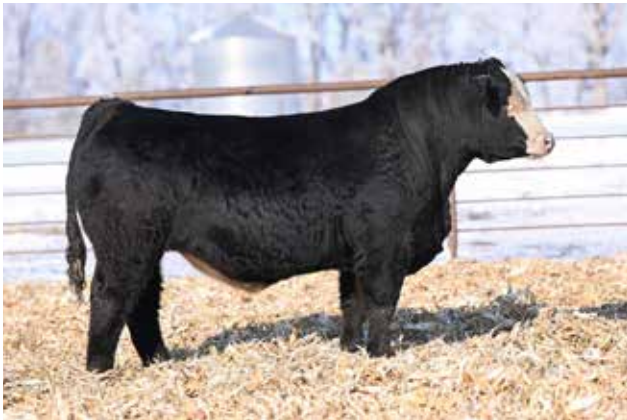
CC HIGHWAYMAN 14J MATERNAL BROTHER TO LOT 1