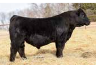
HLTS PINNACLE J107 MATERNAL BROTHER TO LOT 12