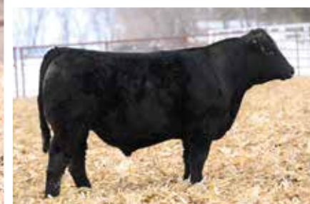
TDSC MR COWBOY T635 318L ET FULL BROTHER TO LOT 67