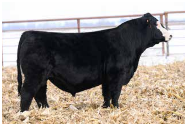
HLTS RIGHT TIME L10 FULL BROTHER TO LOT 2