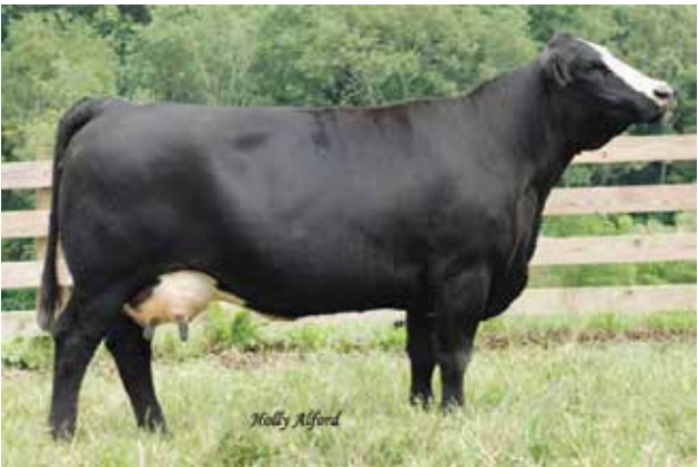
BF VIDALIA MATERNAL GRANDDAM OF LOT 43

AI DATE 4/17/24 TO WINC ALL RIGHT 213K (4100635) PE TO WHF ON POINT K344 (4209449) FROM 4/25/2024 TO 8/1/2024 BULL BRED ESTIMATED DUE 3/15/25