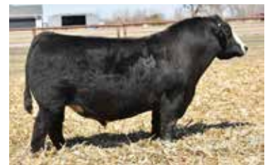
DMCC STOCKMAN 124J SIRE OF LOT 37-40