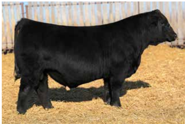
OMF LAREDO L8 MATERNAL BROTHER TO DAM OF LOT 50 & 51