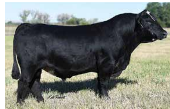
TJ FROSTY 318E MATERNAL GRANDSIRE OF LOT 5