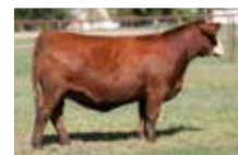
HLTS KIESHA K20 MATERNAL SISTER TO LOT 55