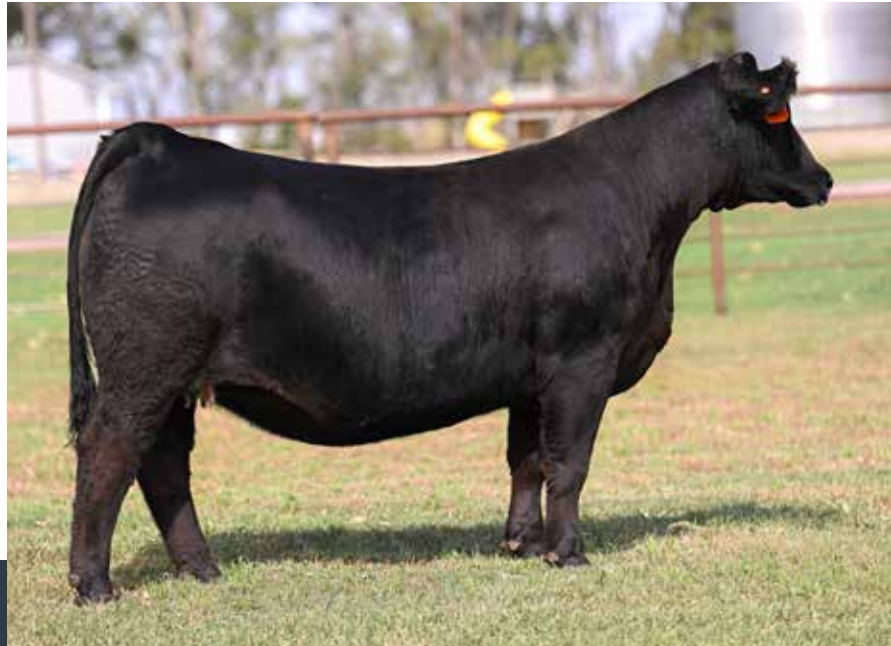
HLTS/CLRWTR SUGAR K5