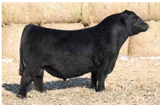
BLACK ACE DOUBLE RUN 4/8 SIRE OF LOT 27