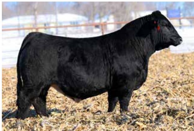
HLTS GAME CHANGER K211 MATERNAL BROTHER TO LOT 42