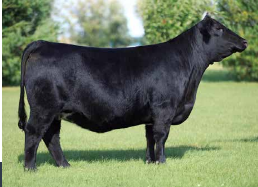
CLRS DAIRY QUEEN 606D