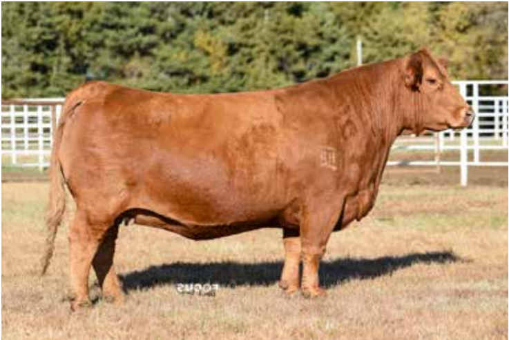
HPF ORANGE CRUSH A378 DONOR DAM OF LOT 101A & 101B EMBRYOS