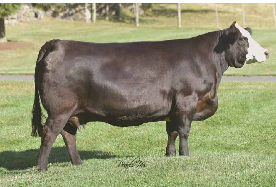
HPF MISTI U353 MATERNAL GRANDAM OF LOT 38