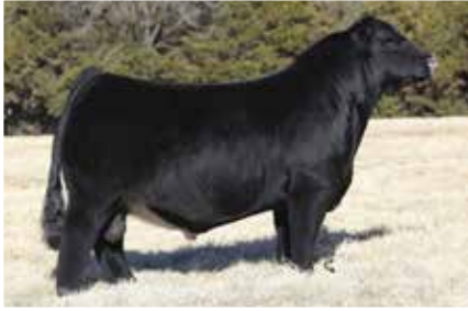
GEFF COUNTY O SIRE OF LOT 62