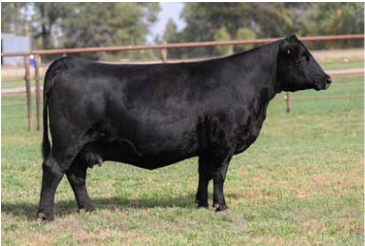
OMF HELE H61 DONOR DAM OF LOT 102A & 102B EMBRYOS