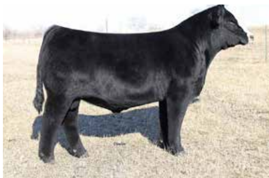
MR TR HAMMER 308A ET MATERNAL BROTHER TO DAM OF LOT 6