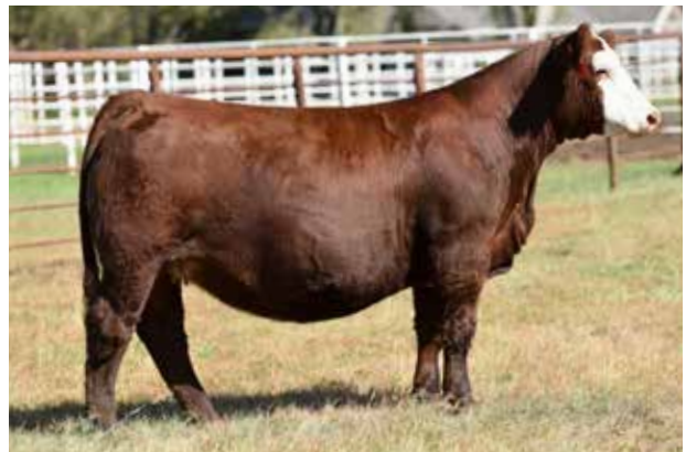
HLTS JEWEL J051 MATERNAL SISTER TO DAM OF LOT 54