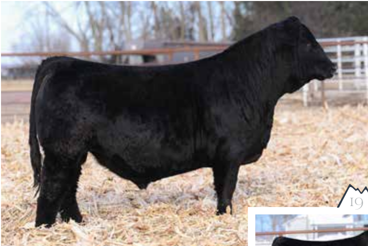
HLTS ORACLE K218 MATERNAL BROTHER TO LOT 19