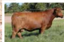
KS MISS SEQUOIA Y770 DAM OF LOT 56