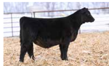
HLTS CORA K202 MATERNAL SISTER TO LOT 8