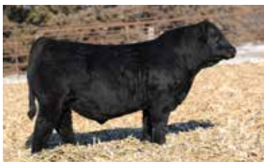
TDSC CKCC MR EPIC 328L ET MATERNAL BROTHER TO LOT 31