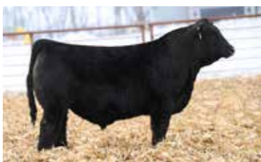
RSSF RIGHT TIME L22 MATERNAL BROTHER TO LOT 32

• The combination of maternal legends in his pedigree suggest that he will sire a sensational set of replacement females just like his impressive dam that we have big expectations for!