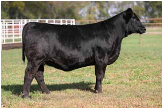
HLTS JOY J57 MATERNAL SISTER TO LOT 3