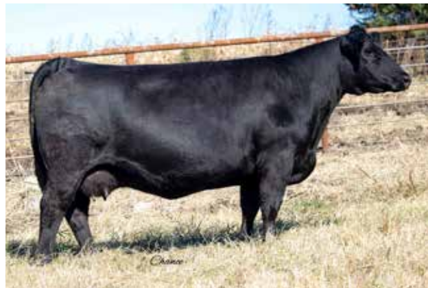
HOOKS ANGEL 11A MATERNAL GRANDAM TO LOT 50 & 51