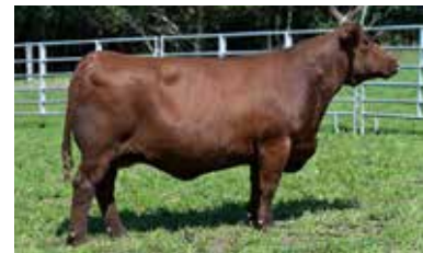
EKHCC RED JEWEL 760 MATERNAL GRANDAM OF LOT 37