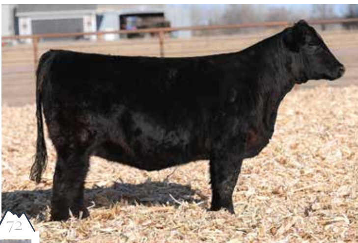
TJ MAIN EVENT 503B SIRE OF LOT 70-73