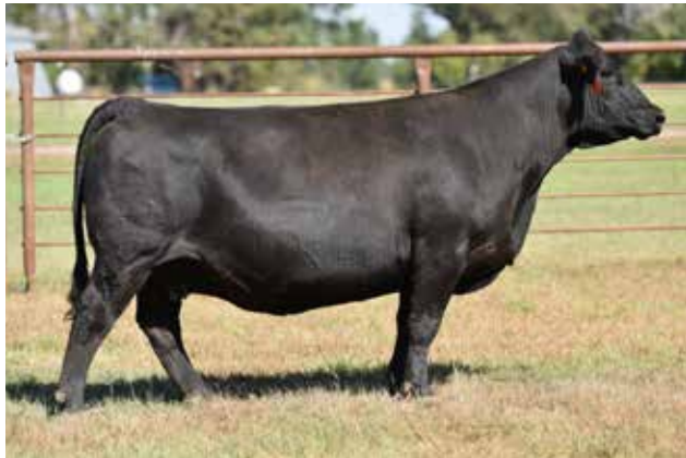
ADB JODY DAM OF LOT 3