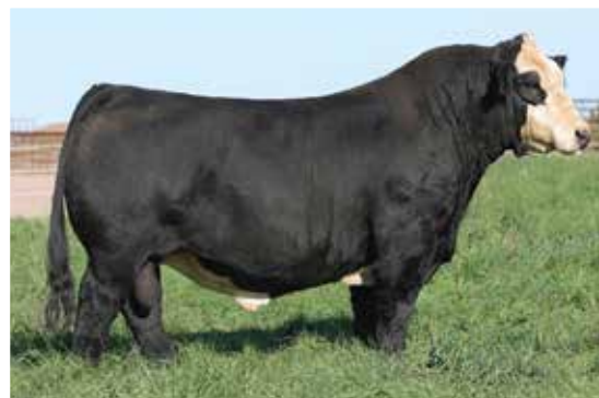
W/C BANKROLL 811D SIRE OF LOT 30