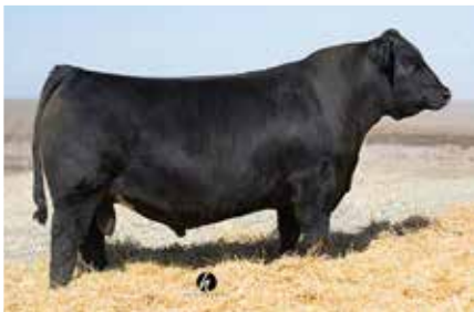
CCR BOULDER 1339A SIRE OF LOT 66