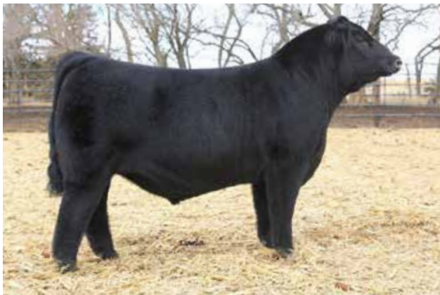
OMF HARD RIGHT H21 MATERNAL BROTHER TO DAM OF LOT 50 & 51

L105 CALVED 1/20/25. BLACK BLAZE HEIFER CALF BY ZTGC JUST CUZ 52K (4063644). TAG N35. 68LBS.