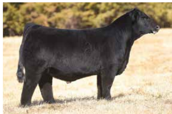
GCC NEW CALIFORNIA 131J 3/4 BROTHER TO SIRE OF LOT 33 & 34