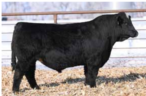
HLTS MAINLINE J44 SON OF A MATERNAL SISTER TO DAM OF LOT 28