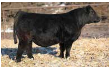
TDSC CKCC MR EPIC 329L ET MATERNAL BROTHER TO LOT 31