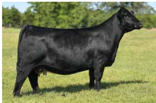
JS BLACK SATIN 9B PATERNAL GRANDDAM OF LOT 33 & 34