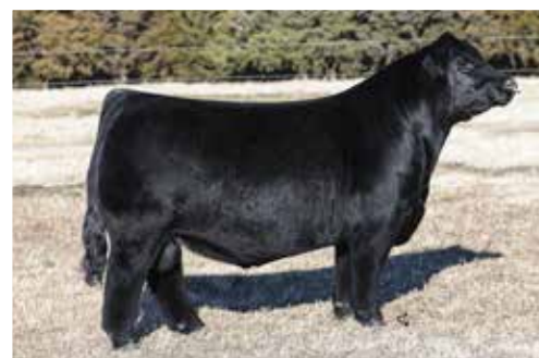
JSUL SOMETHING ABOUT MARY 8421 SIRE LOT 57-59