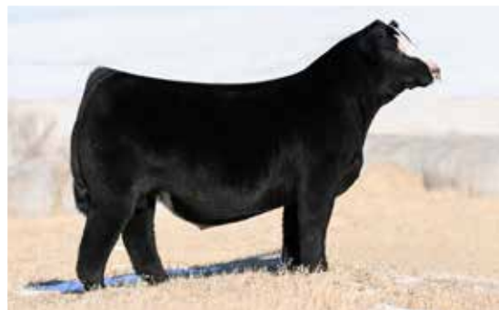
NEXT LEVEL SIRE OF LOT 16-21