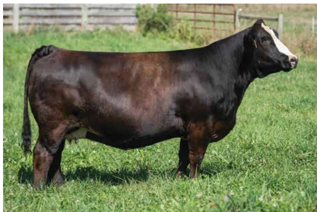
HALEYS MAROON B242 DAM OF LOT 2