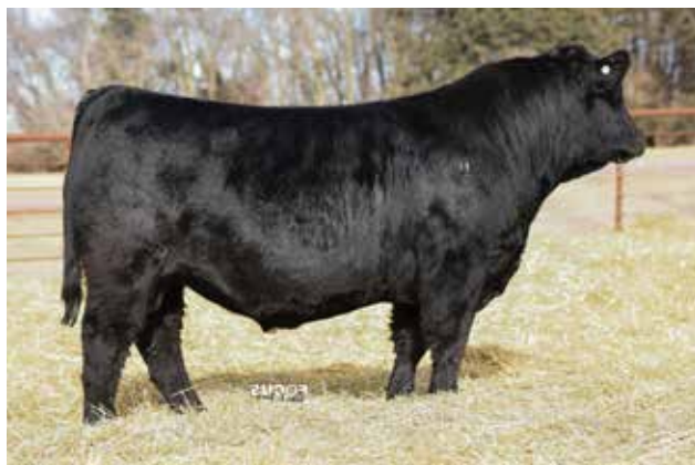
RUBYS PREMIUM OH3 SIRE OF LOT 22