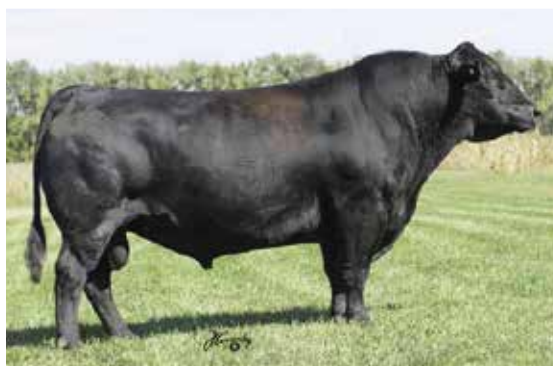
MCM TOP GRADE 018X MATERNAL GRANDSIRE OF LOT 7

• This ES Right Time FA110-4 son is an absolute brute, and in person reads with exactly the same massive and burly physic that you see in his picture.