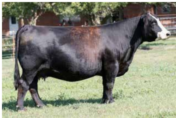
WS MS LOCK DOWN C46 DAM OF LOT 62