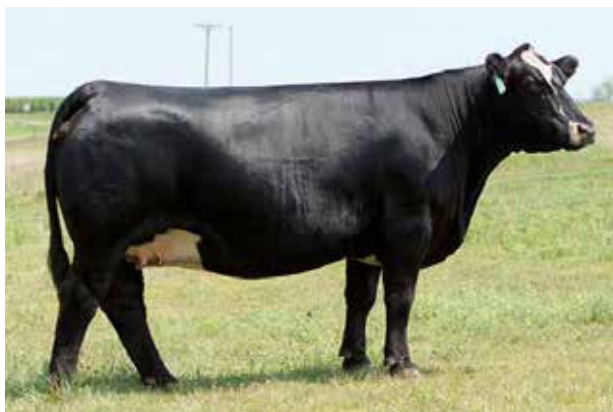
SVF NJC EBONY X319 DAM OF LOT 63

K216 CALVED 1/18/25. BLACK BLAZE BULL CALF BY HLTS/CLRWTR AHEAD OF TIME K1 (4158736). TAG N26. 60LBS.