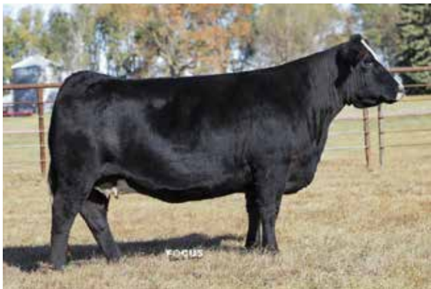
HPF SAZERAC 238B DAM OF LOT 42

K232 CALVED 2/1 25. BLACK HEIFER CALF BY ZTGC JUST CUZ 52K (4063644). TAG N77. 92 LBS.