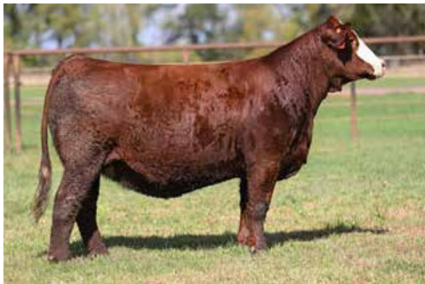
HLTS RED JEWEL J26 MATERNAL SISTER TO DAM OF LOT 54

L141 CALVED 2/1/25. RED BLAZE BULL CALF BY WINC ALL RIGHT 213K (4100635). TAG N76. 86LBS.