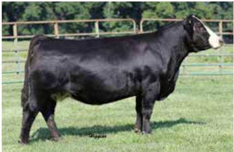
MISS CCF SHEZA LOOKER Y50 MATERNAL SISTER TO DAM OF LOT 47