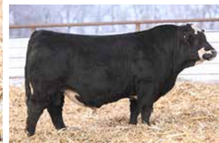
TNC CURRENCY J22 MATERNAL BROTHER TO LOT 68