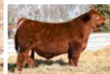
SS FORT HAYES H618 SIRE OF LOT 55 & 56