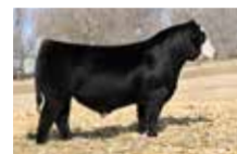
W/C BANK ON IT 273H $202,500 MATERNAL BROTHER TO LOT 56