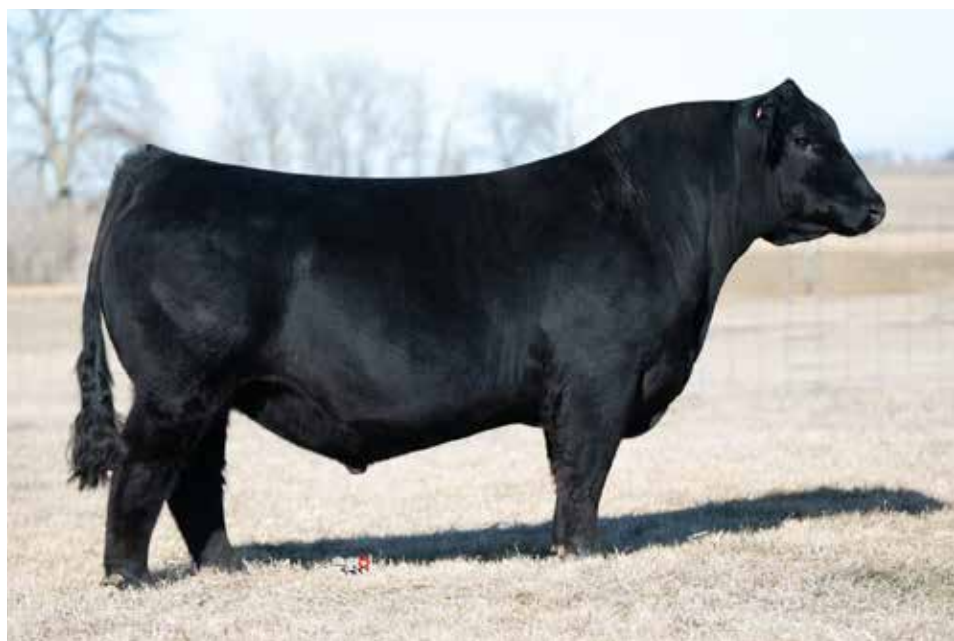
WINC ALL RIGHT 213K SIRE OF LOT 36