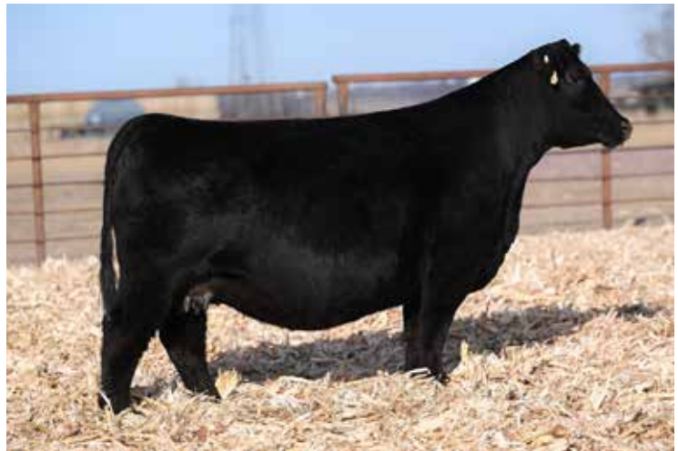
TOD HAVEN 0610

CLRS Dairy Queen is the purebred donor female that we purchased in the fall of 2023 from JS Simmentals. This proven donor female for them program is the absolute rare blend of ideal phenotype and curve bending genetic markers on paper. A female that can be mated to nearly any bull with substantial growth, but most of all, quality and still read relatively good on paper in comparison to contemporaries.