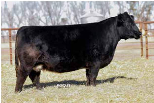
B&K QUEEN SUPREME 28B DAM OF LOT 52 & 53

K224 CALVED 2/1/25. RED BLAZE BULL CALF BY WINC ALL RIGHT 213K (4100635). TAG N78. 75 LBS.