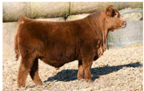
WEBR RESOURCE J82 Sire of Lots 56-61