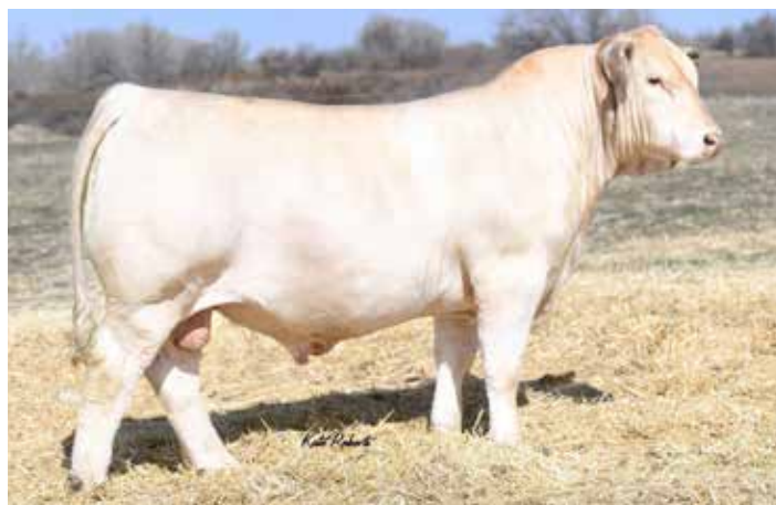
KEYS POWERMAX 57G Maternal Grandsire of Lot 92