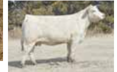
BAR S PISTOL ANNIE 1542 ET Maternal Granddam of Lot 77