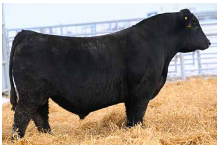
BAR S OUTLAW 2083 Paternal Brother to Lot 34