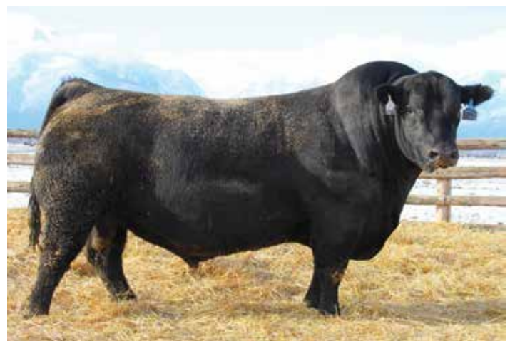
COLEMAN CHARLO 0256 Maternal Grandsire of Lot 117