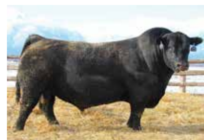
COLEMAN CHARLO 0256 Maternal Grand sire of Lot 4