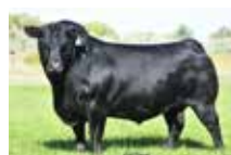
LD CAPITALIST 316 Maternal Grand sire of Lot 42