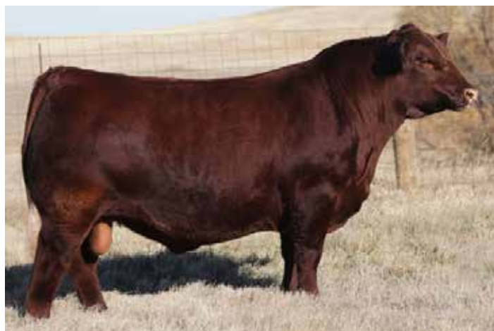
WEBER REFORM 618 Maternal Grandsire of Lot 60