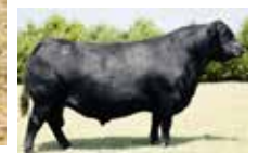
BALDRIDGE ALTERNATIVE E125 Sire of Lots 115-117