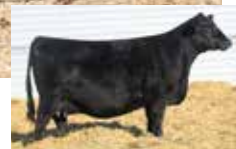
MK NORTHERN MISS E33 Dam of Lot 46