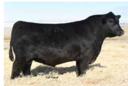
SITZ STELLAR 726D Sire of Lots 26-29