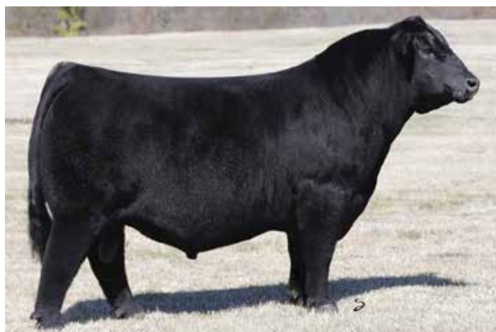
CONLEY EXPRESS 7211 Maternal Grandsire of Lot 49