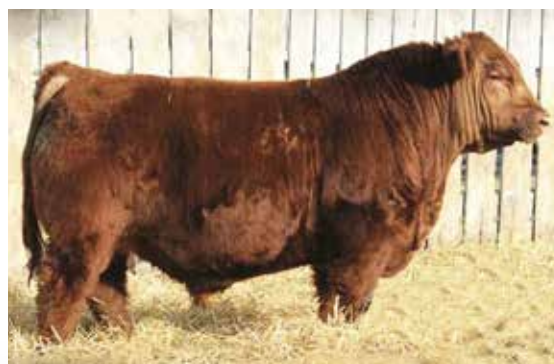
RED MRLA RESOURCE 137E Paternal Grandsire of Lots 56-61