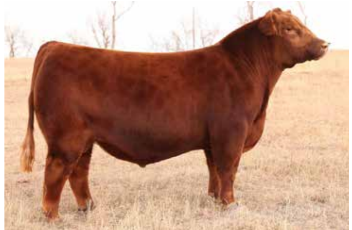
HAHN COUNTRY SQUIRE 1J Sire of Lot 72