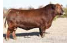
PELTON WIDELOAD 78B Sire of Lots 70 & 71