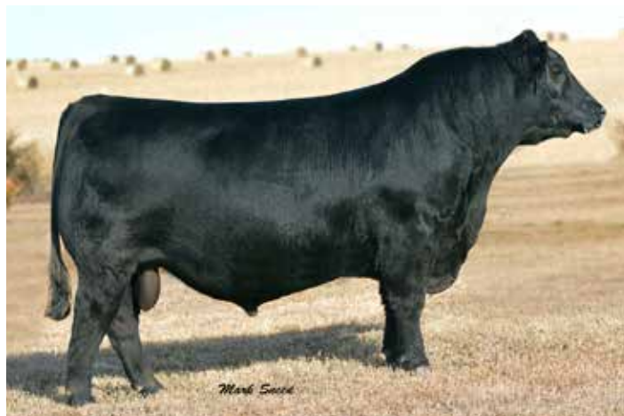
KRAMERS APOLLO 317 Maternal Grandsire of Lot 41