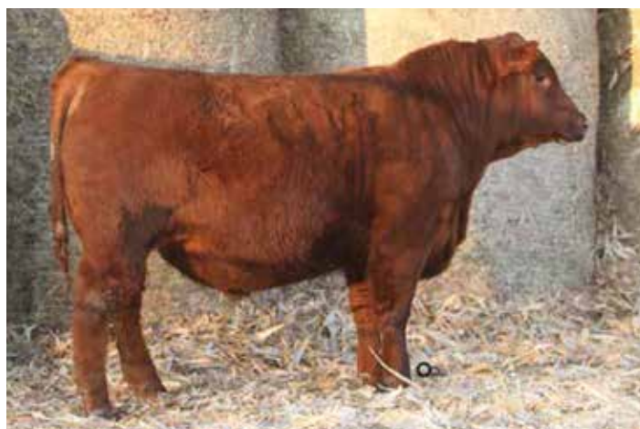
WEBR OPEN RANGE 134H Sire of Lot 61