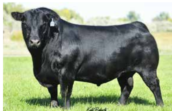
LD CAPITALIST 316 Maternal Grandsire of Lot 2