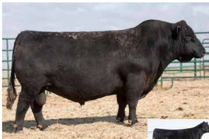
BAR S RANGE BOSS 1118 Paternal Grandsire of Lots 46 & 47