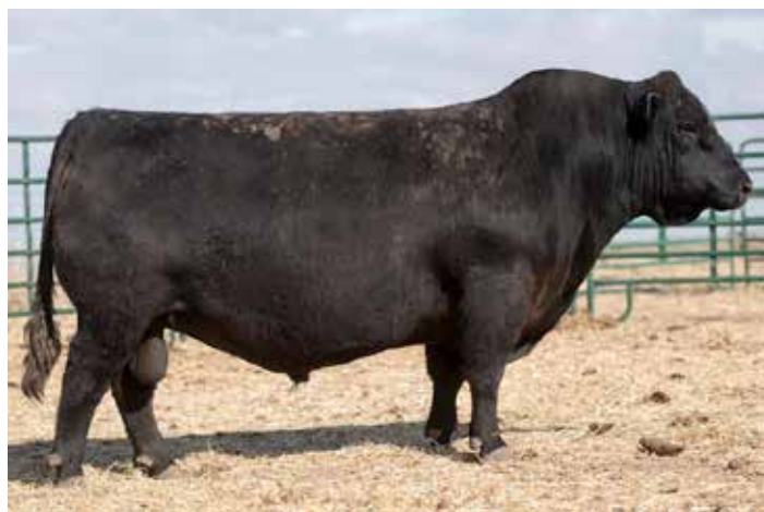
BAR S RANGE BOSS 1118 Maternal Grandsire of Lot 6