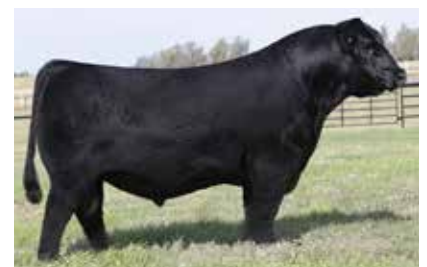
BRDG MAHOGANY PRIME 904B Sire of Lot 114