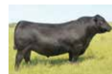
S A V RAINFALL 6846 Paternal Grand sire of Lot 45