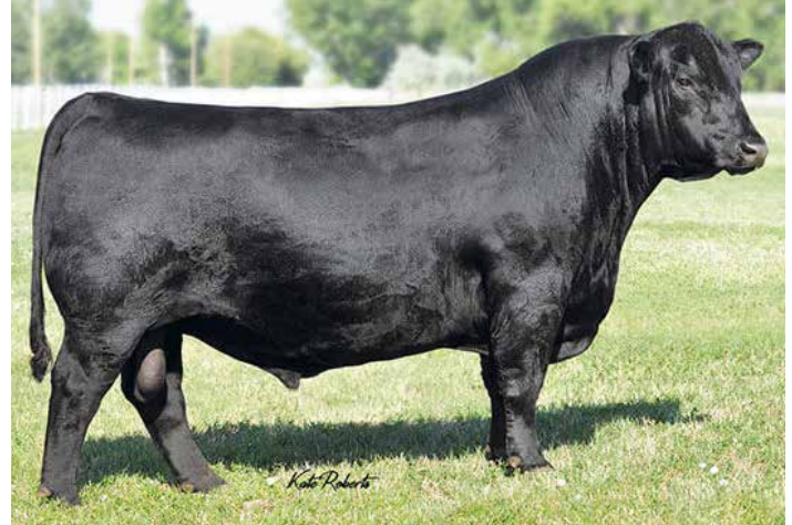
BRUNS BLASTER Maternal Grandsire of Lot 120