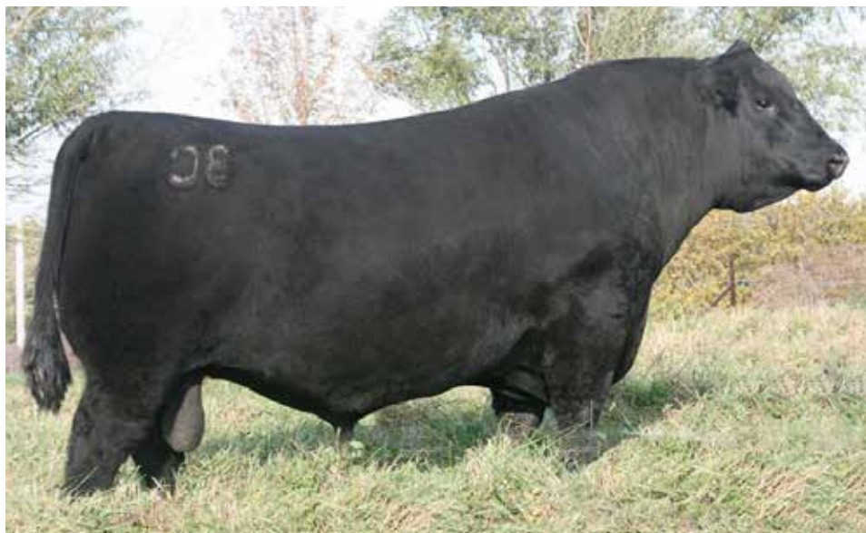
BC CERTIFIED 970-6 Sire of Lot 121