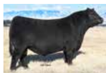
NORTH CAMP SILVER STAR 5103 Maternal Grandsire of Lot 7