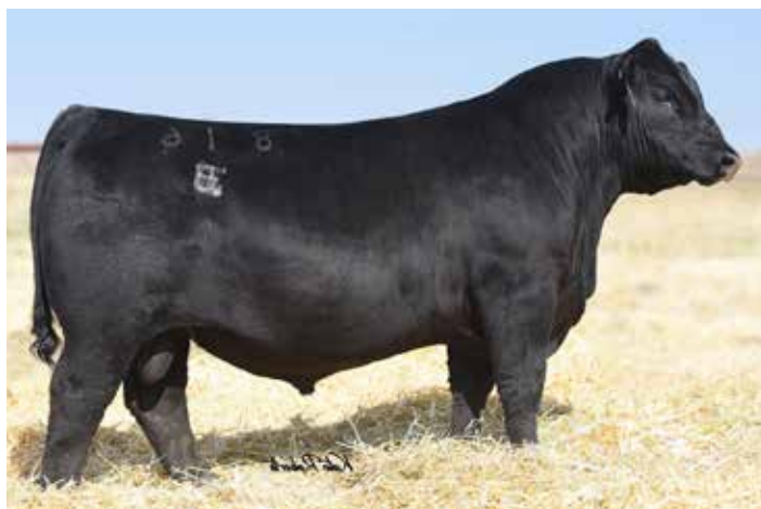
E&B PLUS ONE Maternal Grandsire of Lot 37