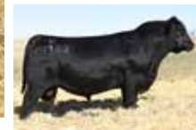
TEHAMA TAHOE B767 Sire of Lot 123