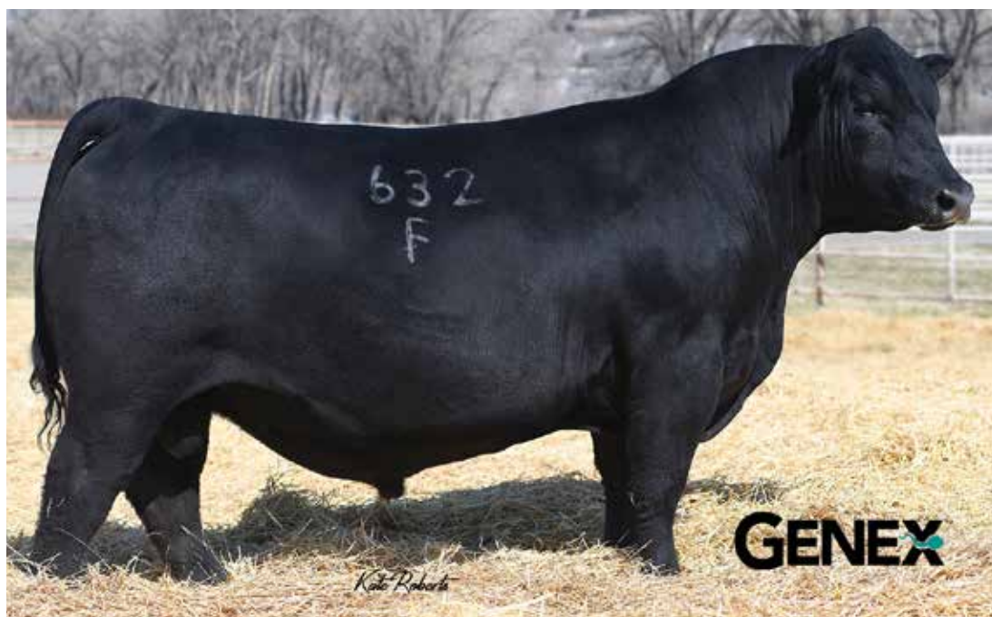
SITZ BARRICADE 632F Sire of Lots 30 & 31