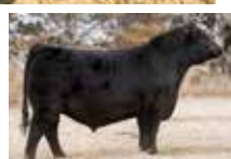
BC ALPHA C1327 Maternal Grand sire of Lot 43