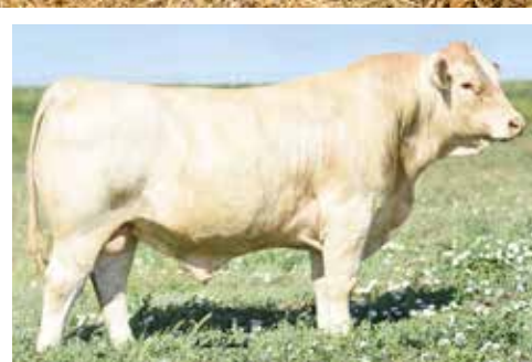
OW LEAD TIME 6294 PLD Sire of Lots 86-92