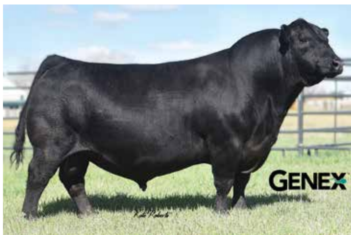
KG JUSTIFIED 3023 Sire of Lot 35