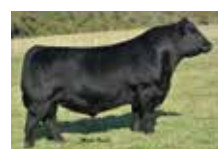
PVF INSIGHT 0129 Paternal Grandsire of Lots 48 & 49