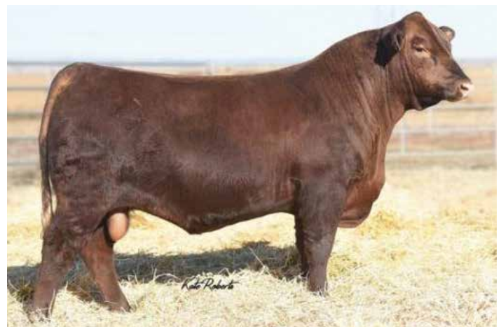
COLLIER FINISHED PRODUCT Paternal Grandsire of Lots 50-54 & Sire of Lot 55