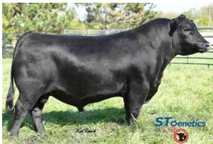
MYERS FAIR-N-SQUARE M39 Sire of Lots 38 & 41