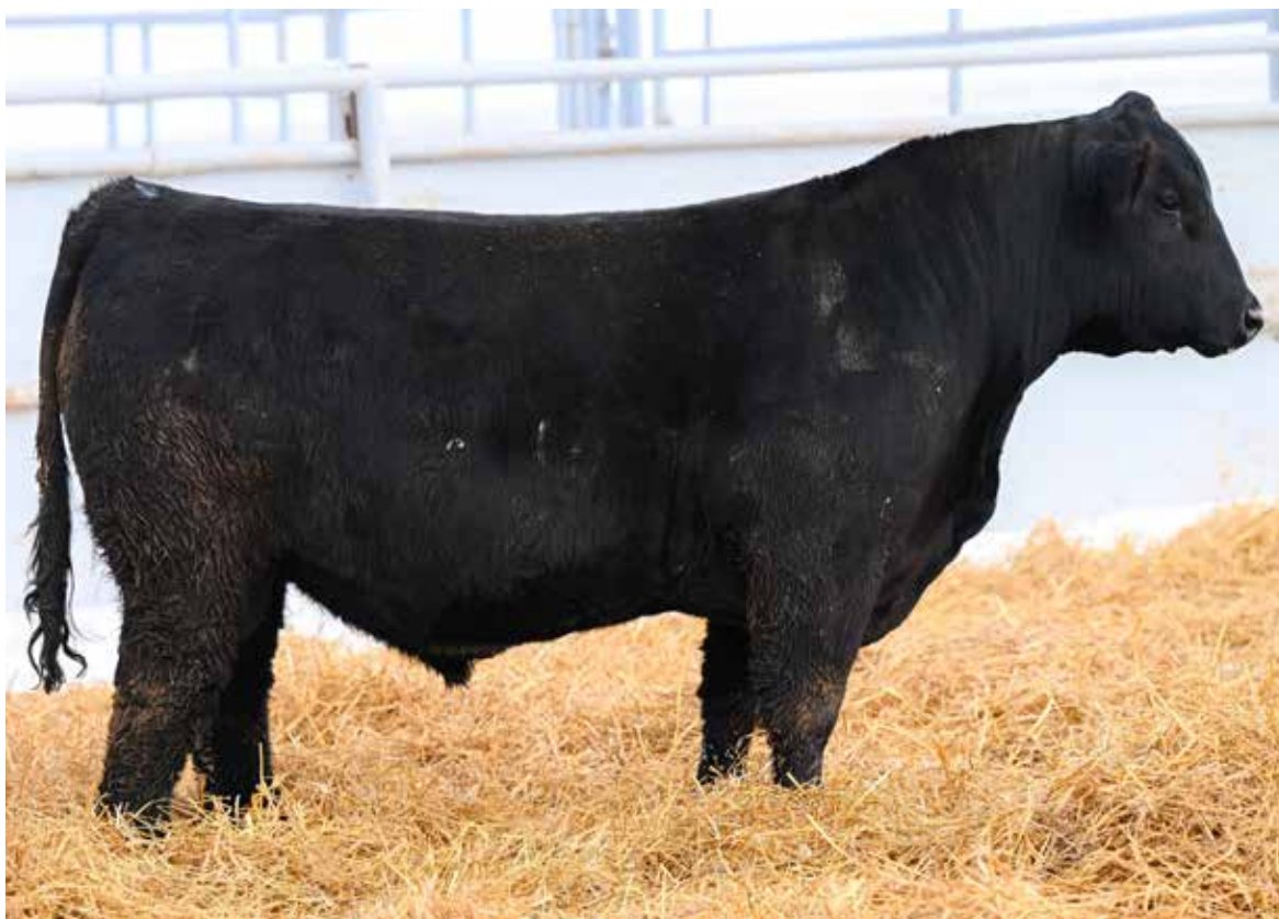
BAR S WAMPUM 2186 Paternal Brother to Lots 9-11