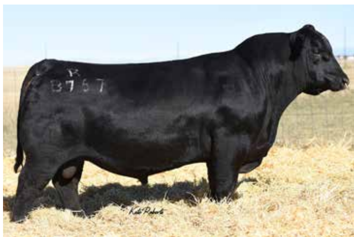
TEHAMA TAHOE B767 Sire of Lots 36 & 37