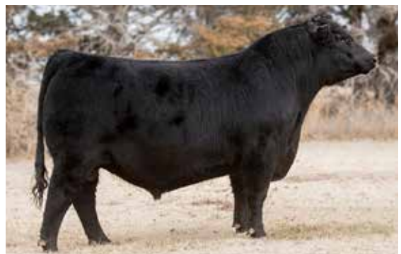
BC ALPHA C1327 Sire of Lots 1-8