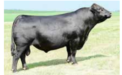
T/D DOC RYAN 049 Sire of Lots 111 & 112