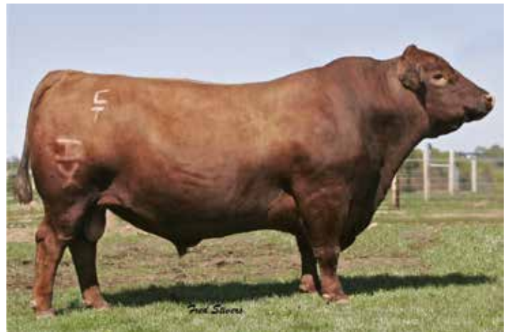
HXC CONQUEST 4405P Sire of Lot 73