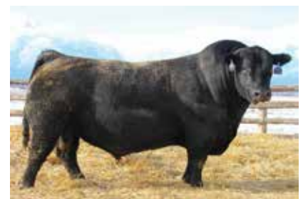
COLEMAN CHARLO 0256 Maternal Grandsire of Lot 103