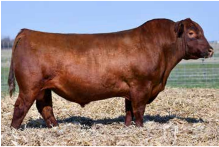
LSF SRR TAKEOVER 5051C Sire of Lots 68 & 69