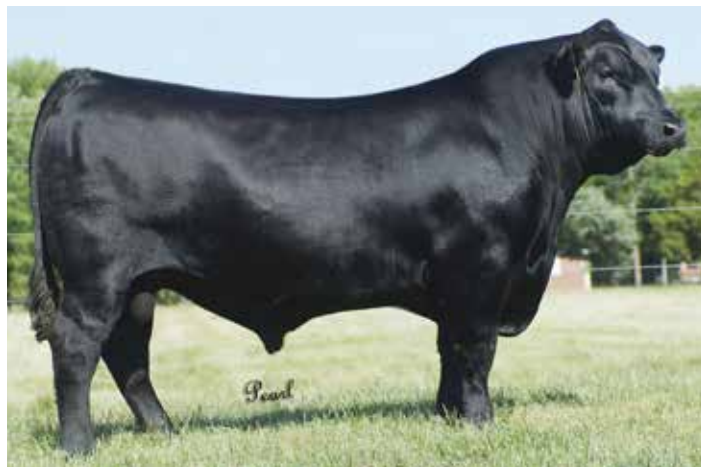
CONNEALY THUNDER Maternal Grandsire of Lot 5