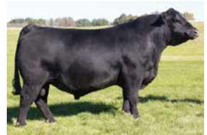
B A R DYNAMIC Sire of Lots 101-107