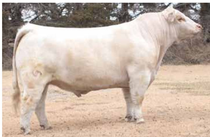
BAR S GOLDEN STATE 5532 Sire of Lots 81-85