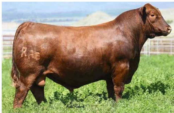
BIEBER SPARTAN E639 Sire of Lots 64-66