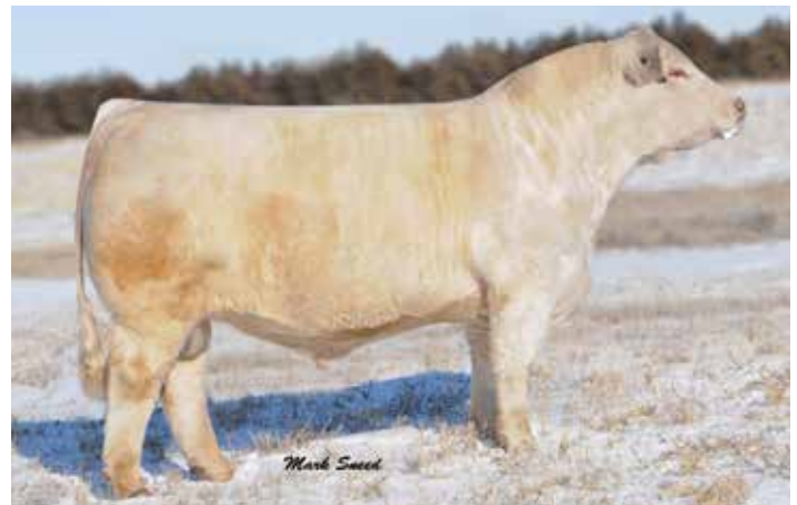
TR PZC RAPID FIRE 9775 ET Maternal Grandsire of Lots 80 & 81