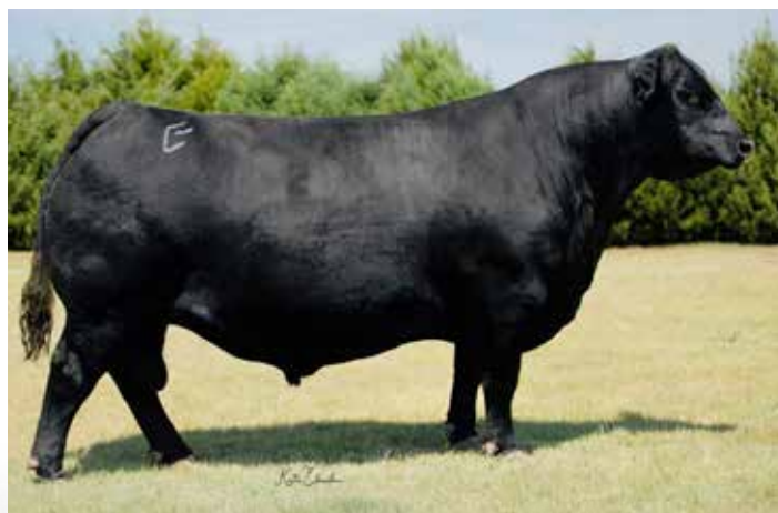
BALDRIDGE ALTERNATIVE E125 Sire of Lots 14-20