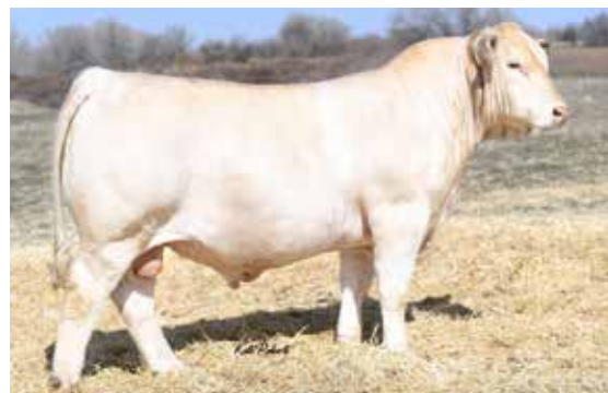
KEYS POWERMAX 57G Sire of Lots 76 & 77