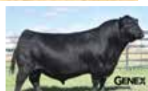
KG JUSTIFIED 3023 Sire of Lot 110