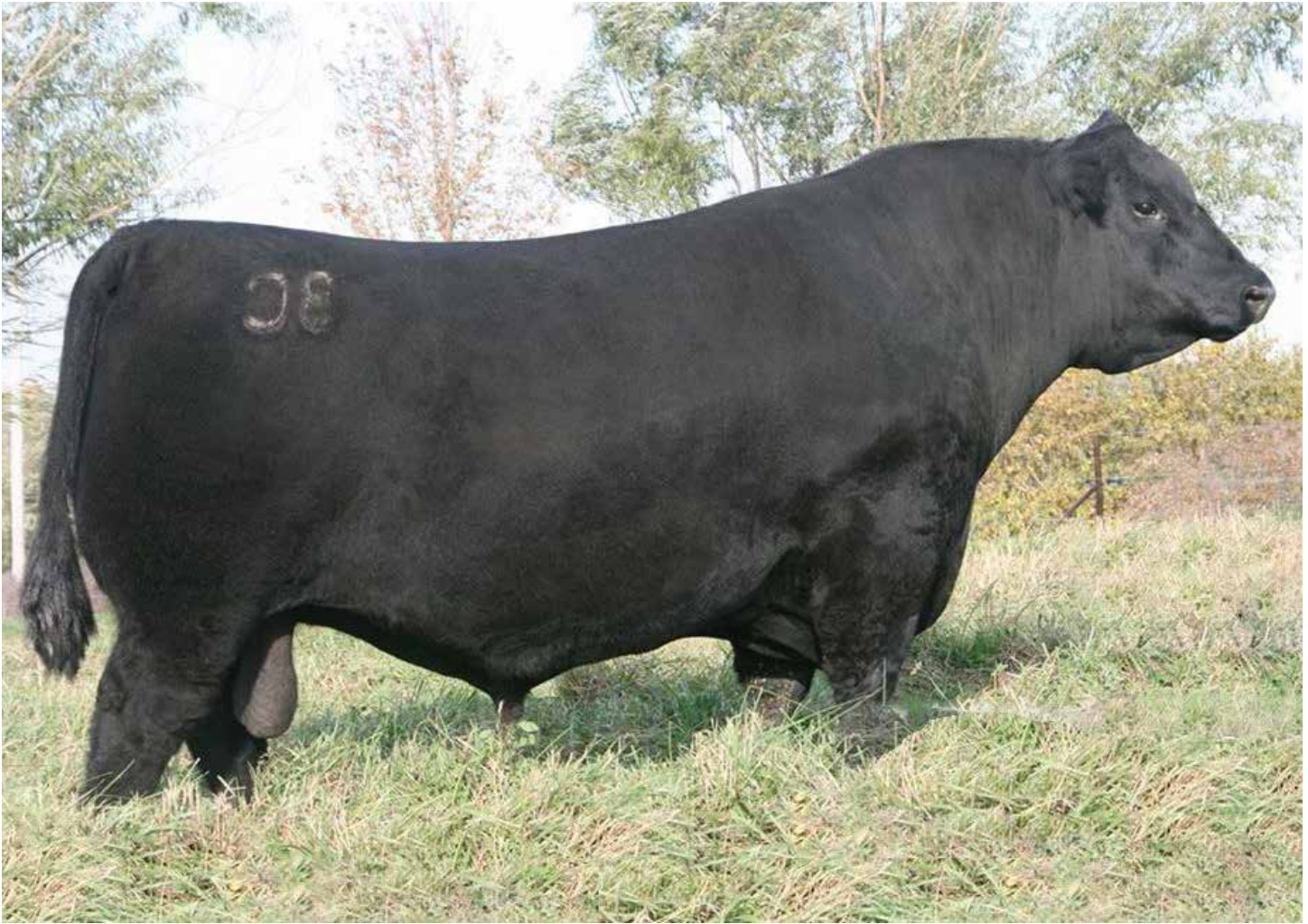
BC CERTIFIED 413-1 Paternal Grandsire of Lots 12 & 13