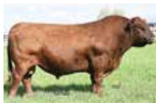
WFL MERLIN 018A Paternal Grand sire of Lot 74