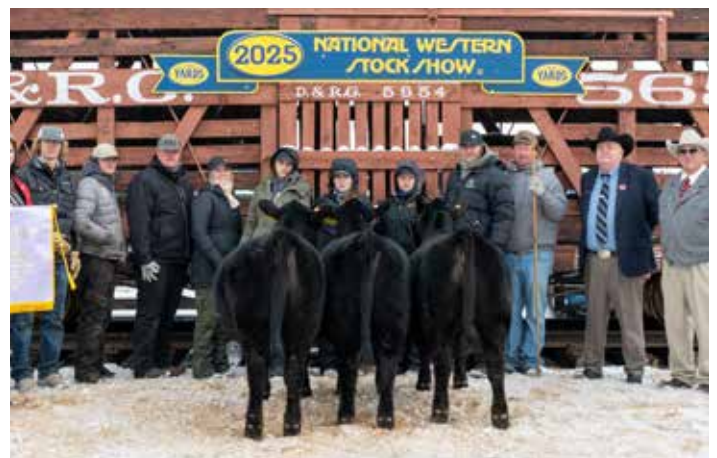
2025 NWSS RESERVE GRAND CHAMPION PEN OF THREE ANGUS HEIFERS Lots 101-103