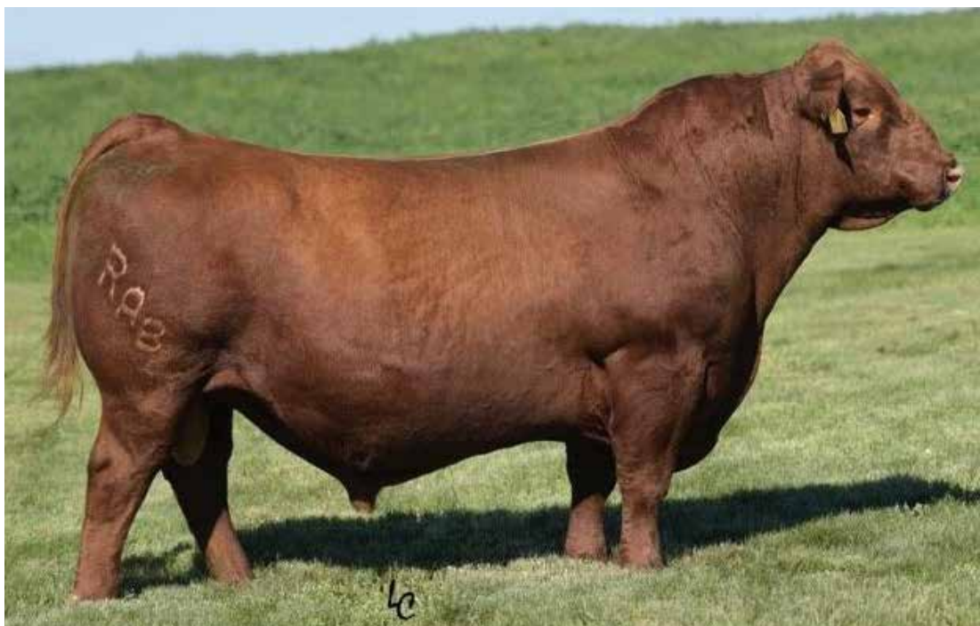
BIEBER HARD DRIVE Y120 Sire of Lot 67