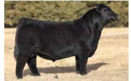
STAG GOOD TIME 201 ET Sire of Lot 113

ANGUS | REG: 21044681 113 OPEN HEIFER BAR S PRIDE 4006