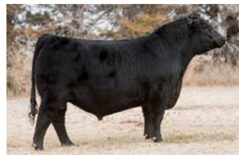
BC ALPHA C1327 Sire of Lots 118 & 119