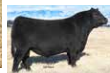
NORTH CAMP SILVER STAR 5103 Maternal Grandsire of Lot 124