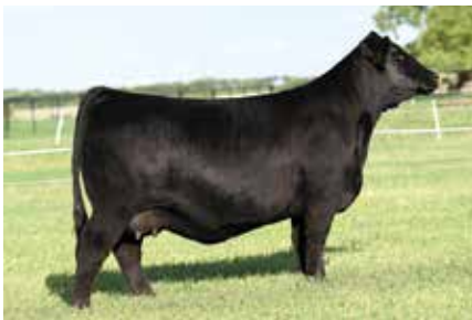
KCC1 SWC HARMONY 847H | Dam of 3BCC KCC1 Krypton 100K

KCC1 3BCC NEXT PHASE 4L $95,000 maternal brother to 3BCC KCC1 Krypton 100K