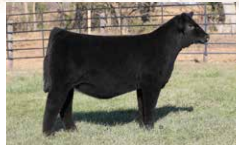
FRKG COUNTESS OF 924 013L $105,000 Full Sister to Lot 101