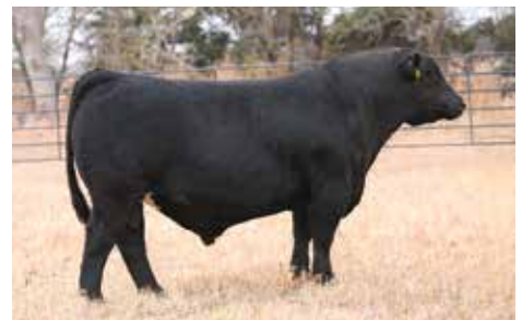
RUBY NFF SRIRACHA K247 Service sire to several females throughout the offering!