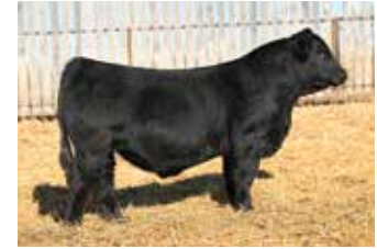
OMF/DKSM DENSITY J34 | $52,000 Sire of Lot 25