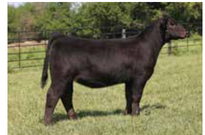
FRKG COUNTESS 9J $24,000 Maternal Sister to Lots 12-15