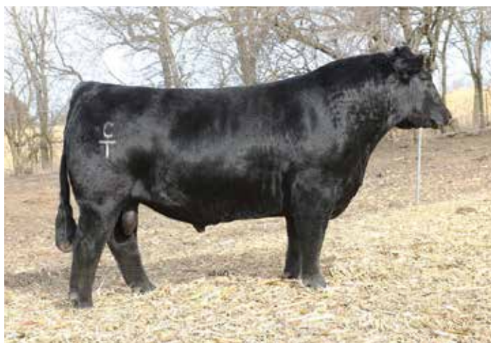
TJ HIGH CALIBRE 556B | $400,000 Maternal Grand sire of Lot 111