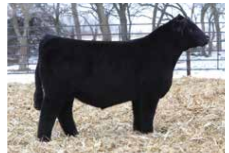
TL REVENANT 35 | $100,000 Sire of Lot 23