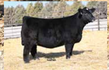
MECC ANNIE OAKLEY 211A | Dam of Lot 9