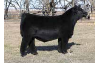
STCC TECUMSEH 058J $620,000 Sire of Lot 108-112