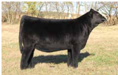
LADY DI $120,000 Maternal Sister to Dam of Lots 103 & 104