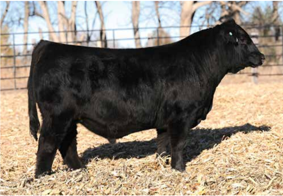
LOT 2 | JSUL REMINGTON 4363M