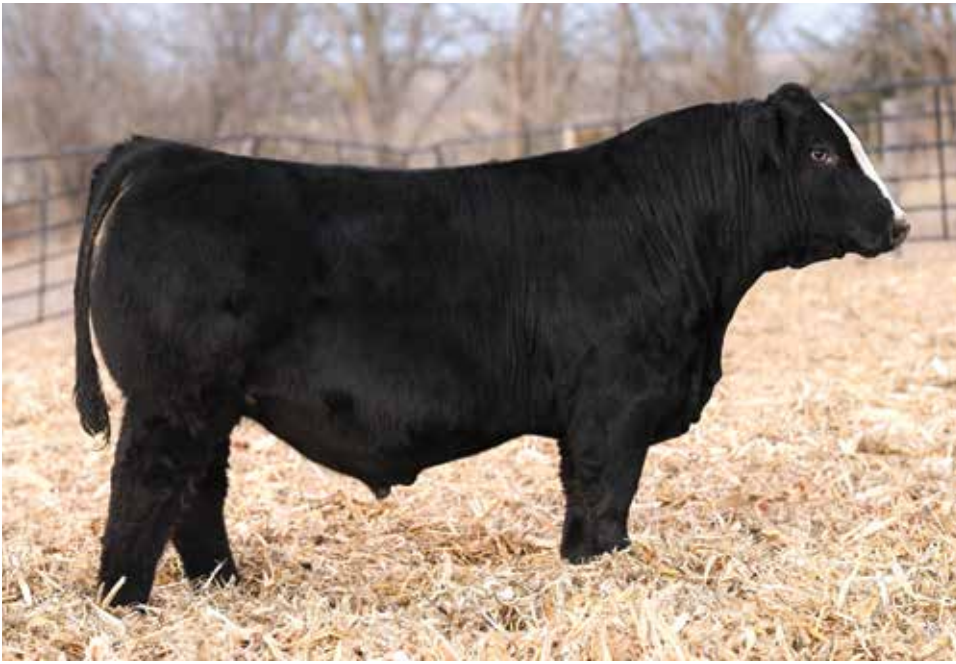
LOT 25 | MOORE FUTURE 28M