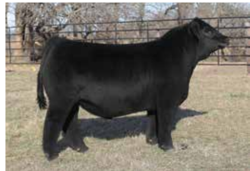
FRKG JOURNEY 71J | Maternal Brother to Lot 22