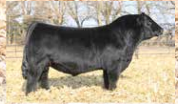
EC REBEL 156F | $200,000 Sire of Lot 101