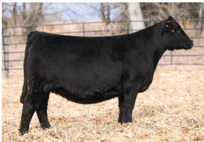
LOT 110 | VCL COUNTESS 42L