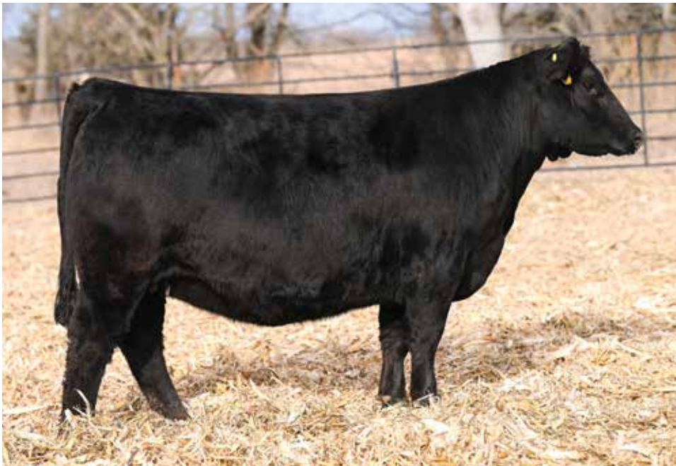
LOT 109 | VCL COUNTESS 50L