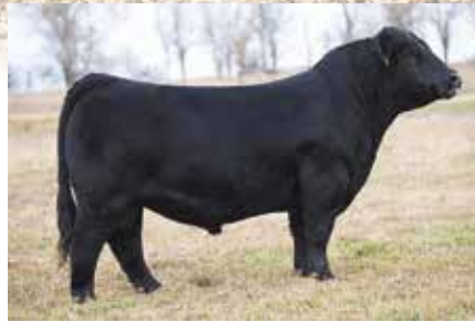
PROFIT $400,000 Full Brother to Dam of Lot 16