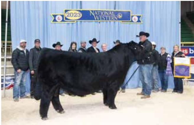
2023 NWSS Grand Champion Purebred Simmental Bull Congratulations GKB Cattle!