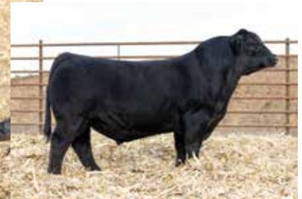
OMF EPIC E27 Famous maternal brother to OMF Doc Lynn L92

Lots B1-10 Selling 30 units of conventional semen in packages of 3 units