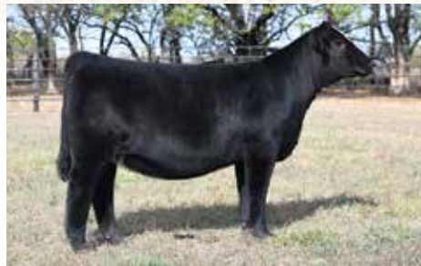
FRKG COUNTESS 924J $225,000 Full Sister to Lot 101