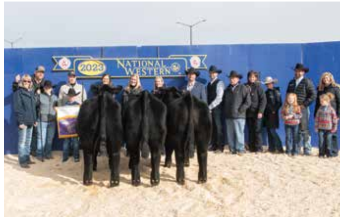
2023 NWSS Grand Champion Pen of Three Purebred Simmental Bulls