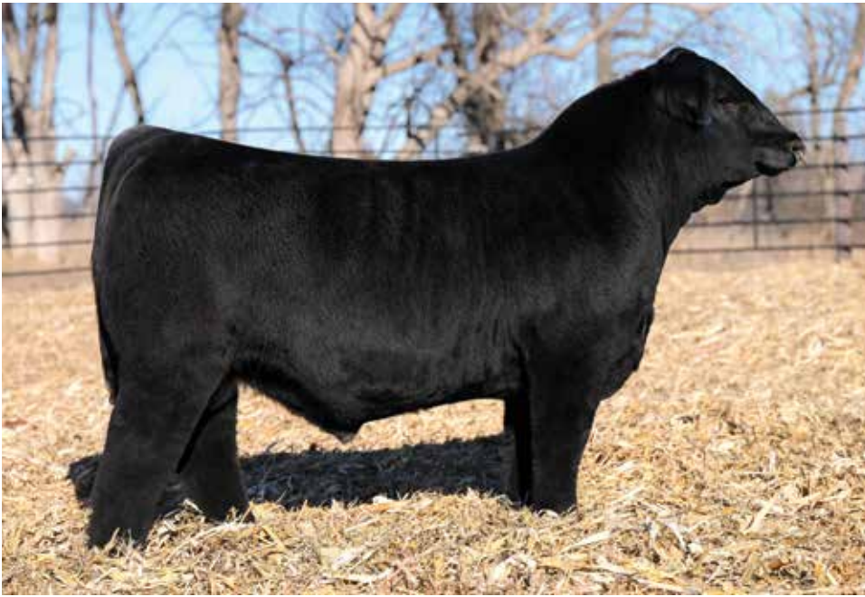
LOT 14 | FRKG MADRID 10M