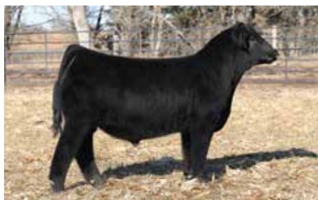
OMF DOC LYNN L92 $300,000 son of STCC Tecumseh 058J