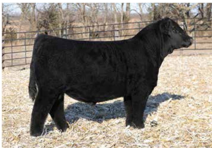
BOWLING'S THOR 985K | $15,000 Maternal Brother to Lot 112