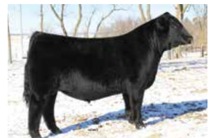
RUBY'S CURRENCY 7134E $435,000 Maternal Grand sire of Lot 8