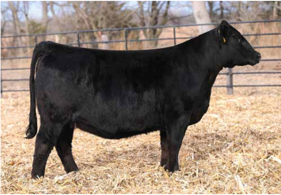
LOT 106 | VCL COUNTESS 6L