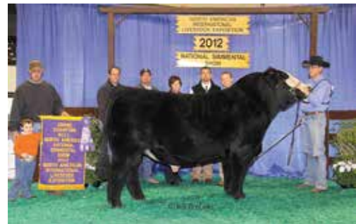
MR HOC BROKER | Triple Crown Winning Sire of Lot 21