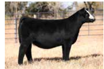
KC2 MISS VICTORIA 396M $50,000 Maternal Sister to Lot 26