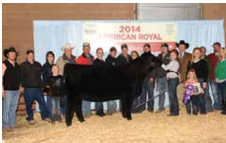
FIREFLY 311A 2014 American Royal Grand Champion Purebred Simmental Heifer Dam of Lots 103 & 104