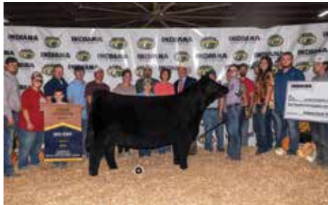
PERFECT ANGEL 58H 2021 IN Stock Show Grand Champion Heifer Dam of Lots 10 & 11