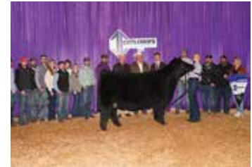
4/B MISS HONEY BUTTER 08J 2023 Cattlemen's Congress Supreme Champion Junior Breeding Heifer Dam of Lot 2