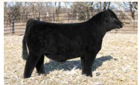
3BCC KCC1 KRYPTON 100K $450,000 service sire to several females throughout the offering!