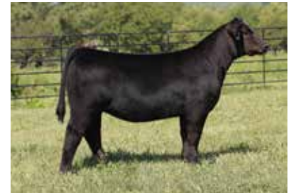
FRKG COUNTESS 8J $43,000 Maternal Sister to Lots 12-15