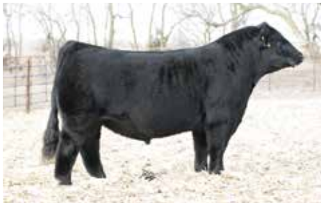
ACLL FORTUNE 393D $185,000 Maternal Brother of Lots 103 & 104