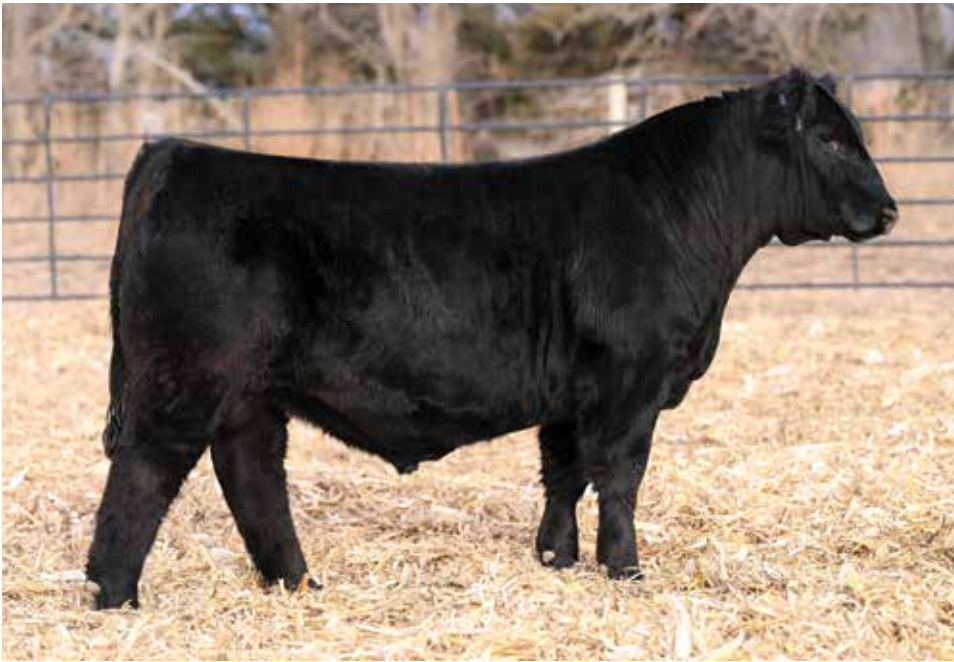
LOT 19 | GPG MINATARE 904M