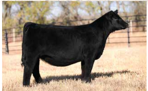
FRKG COUNTESS OF 923 148M | $40,000 Full Sister to Lots 12-15