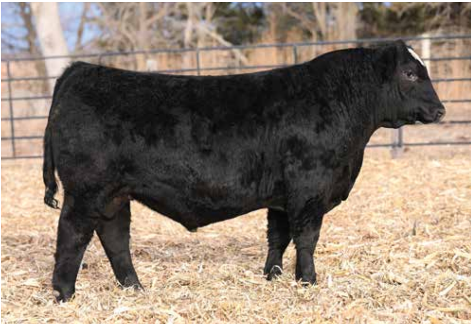
LOT 26 | KC2 JOURNEYMAN 8019M