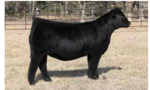
BOWJ JUST AN ANGEL 1K $175,000 Maternal Sister to Lots 10 & 11