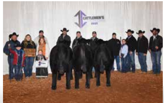
2021 Cattlemen's Congress Grand Champion Pen of Three Purebred Simmental Bulls