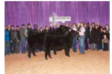
VCL SENSATION 251J 2024 Cattlemen's Congress Grand Champion Simmental