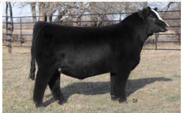
FRKG CRUSADER 356J | $13,000 Maternal Brother to Lots 12-15