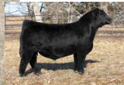
FRKG ALPHA 311L $700,000 world record selling son of STCC Tecumseh 058J

Lots A1-10 Selling 30 units of conventional semen in packages of 3 units