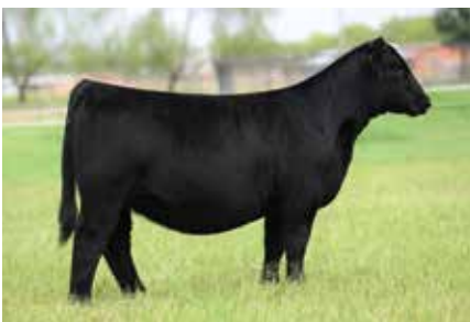
3BCC KCC1 SWC HARMONY 4019M $82,500 maternal sister to 3BCC KCC1 Krypton 100K