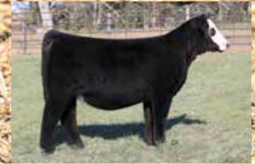
HERBSTER COUNTESS 11L | Full Sister to Lot 6