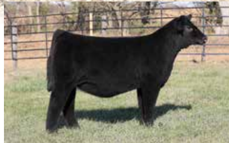
FRKG COUNTESS OF 924 013L $105,000 Full Sister to Dam of Lot 6