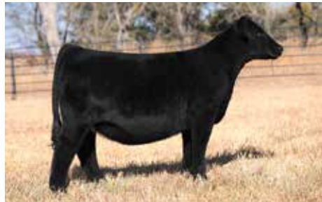
BOWJ PERFECT ANGEL 200M $200,000 Maternal Sister to Lots 10 & 11