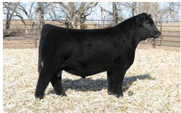
GPG CORNERSTONE 1K | $510,000 Full Brother to Dam of Lot 9