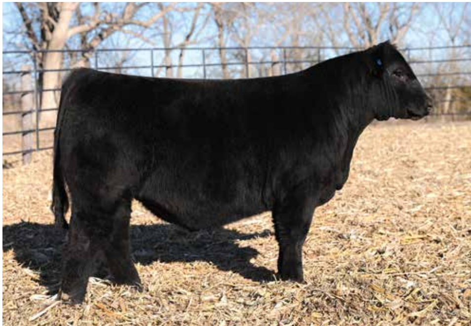
LOT 3 | LKCC MR MOSCOW MULE 153M