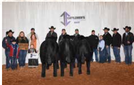
GPG BENEFIT 247H Member of the 2021 Cattlemen's Congress Grand Champion Pen of Three Purebred Simmental Bulls