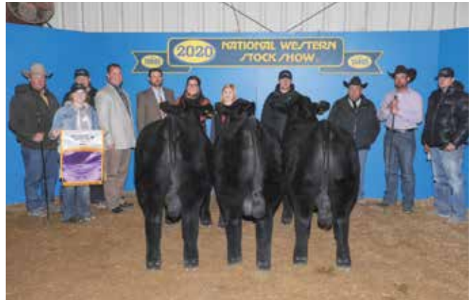
2020 NWSS Grand Champion Pen of Three Purebred Simmental Bulls