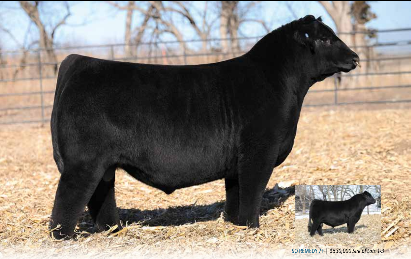
SO REMEDY 7F | $530,000 Sire of Lots 1-3