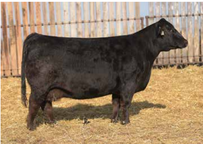
OMFTIME LESS B100 | Dam of OMF Doc Lynn L92