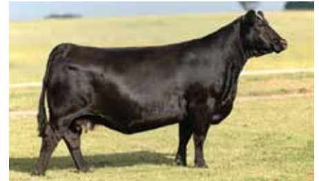
RWA KRISHA-ET Dam of Lot 20