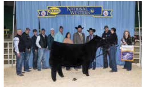
LKCC MISS CRYSTEEL'S REMEDY 44J 2022 NWSS Grand Champion Purebred Simmental Heifer 3/4 Sister in Blood to Lots 103 & 104