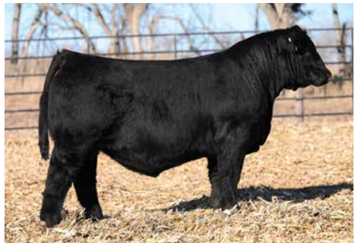
LOT 18 | DSFF MINOT 692M