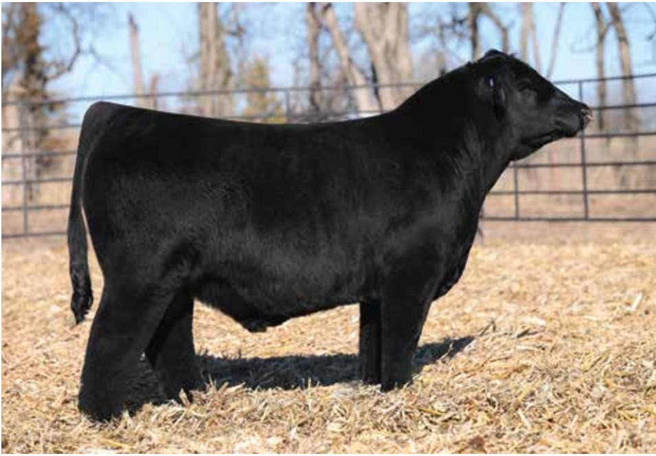
LOT 23 | G/S REVOLUTION M47