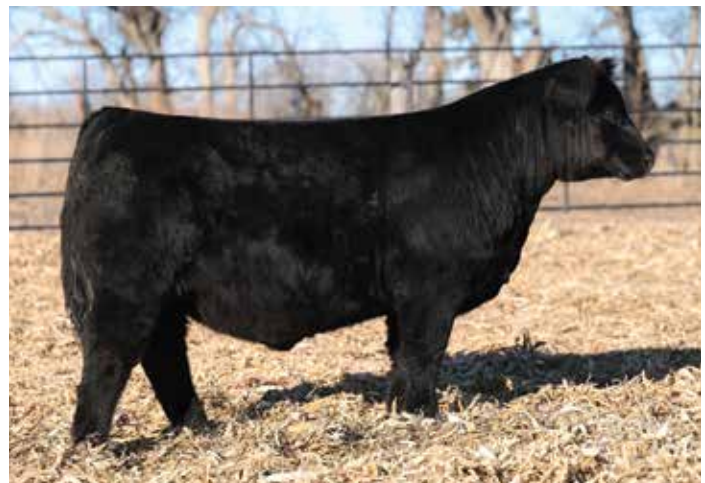
LOT 11 | BOW J MARCO 229M