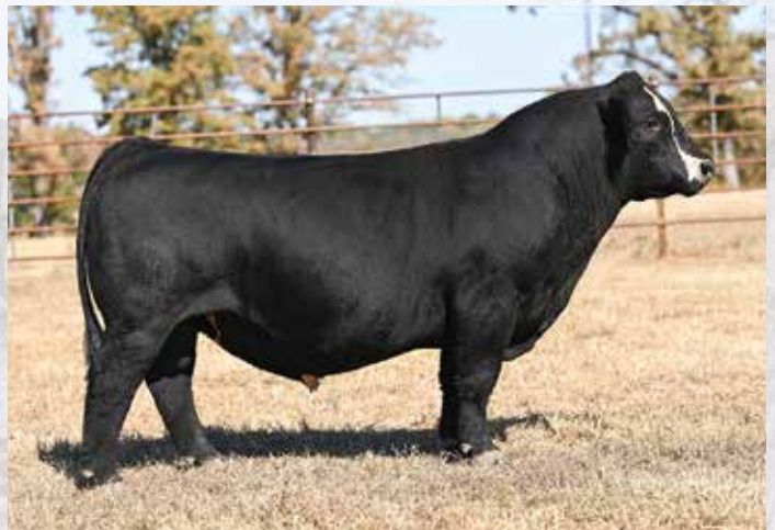
HCCO PAYBACK 166H | Maternal Brother of Lot 5