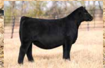
FRKG PANARAMA 971M | $29,000 Full Sister to Lot 16