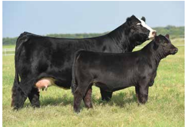
WAGR CHANEL 5073C | Maternal Sister to Dam of Lot 18