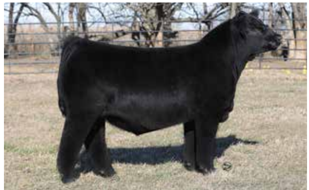
STCC TECUMSEH 058J | Sire of Lots 9-20