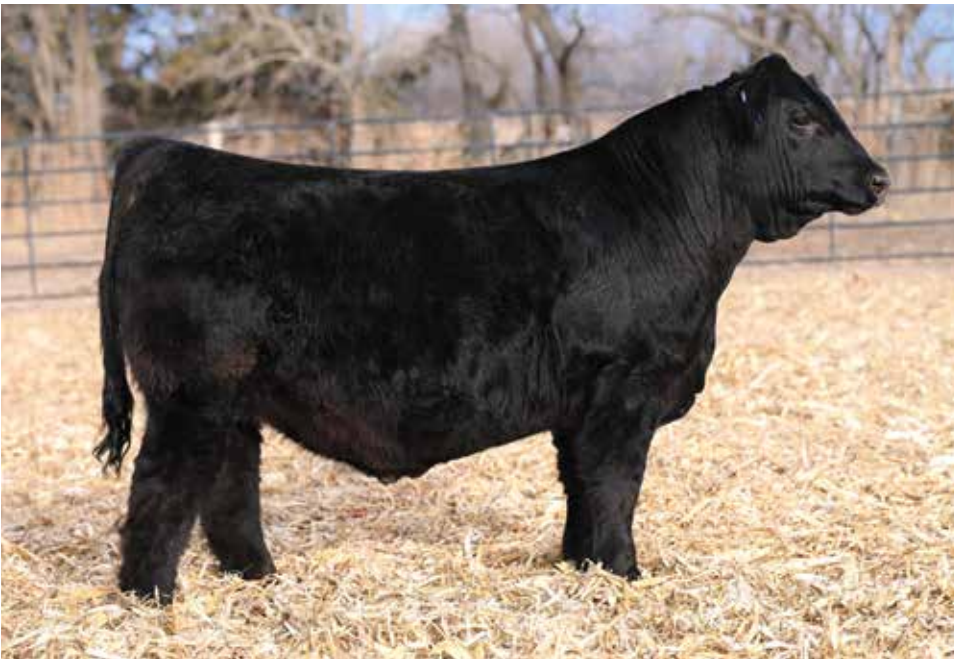
LOT 8 | JMCR MR DYNAMO 9242M