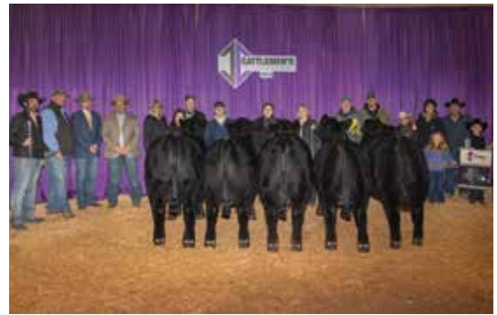
2022 Cattlemen's Congress Grand Champion Pen of Five Purebred Simmental Bulls