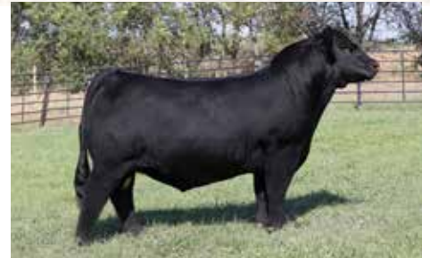
FRKG CLASSIC 948K $210,000 Full Brother to Lot 1