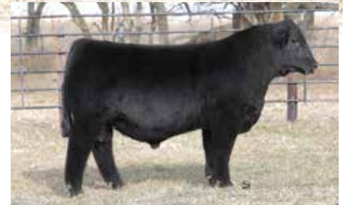
FRKG NEW FASHION 75J $160,000 Full Brother to Dam of Lot 6