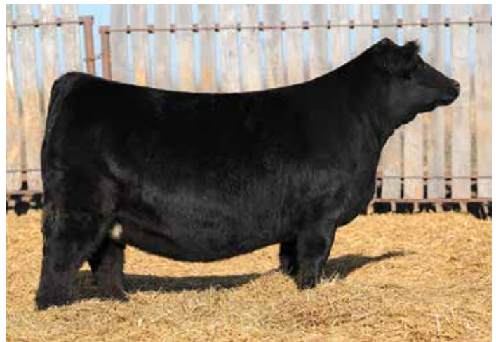
OMF KRISTY K88 | $128,000 Maternal Sister to OMF Doc Lynn L92