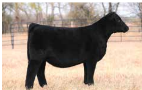
FRKG BAILEY 1920M $170,000 daughter of STCC Tecumseh 058J