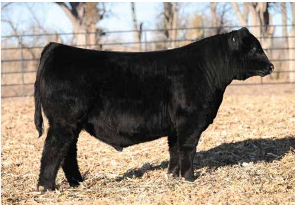
LOT 24 | B BAR MAN UP 550M