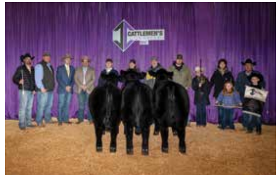
2022 Cattlemen's Congress Grand Champion Pen of Three Purebred Simmental Bulls