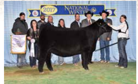
PANARAMA 52C 2017 NWSS Reserve Grand Champion Purebred Simmental Heifer Full Sister to Dam of Lot 16