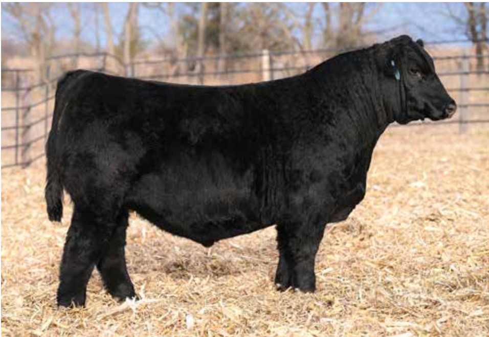
LOT 15 | FRKG MR TECUMSEH 79M ET