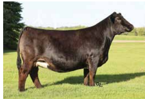
RJ PF PENNY 010H | Dam of Lot 21

HARTMAN CATTLE COMPANY & CRIBBS CATTLE COMPANY RESERVE THE RIGHT TO 100 UNITS OF CONVENTIONAL SEMEN EACH FOR IN HERD USE ONLY.