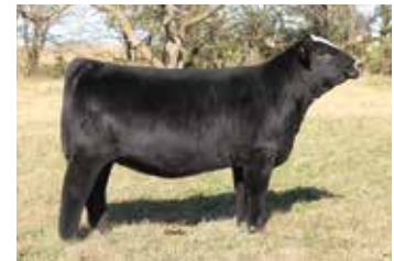
ACLL SHANNON 385C $70,000 Maternal Granddam of Lot 3