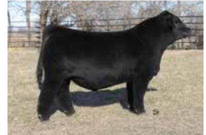
4/B DYNAMO $120,000 Sire of Lots 4-8