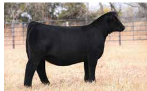
EC ANGEL 135M $51,000 daughter of STCC Tecumseh 058J