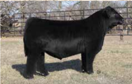
FRKG VICTORY 78J $210,000 Maternal Brother to Lot 16