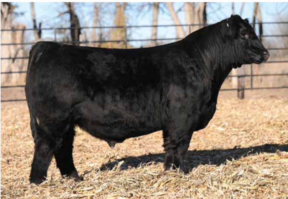
LOT 20 | B BAR MAXIMUS 833M ET