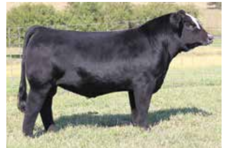
MR CCF VISION Maternal Grand sire of Lot 106