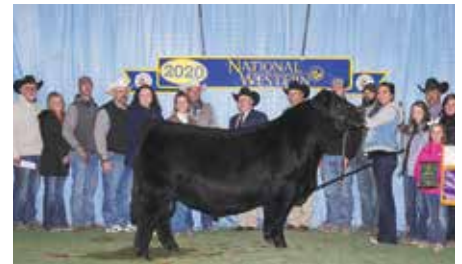
RECKONING 711F 2020 NWSS Grand Champion Percentage Simmental Bull Maternal Brother to Lot 20