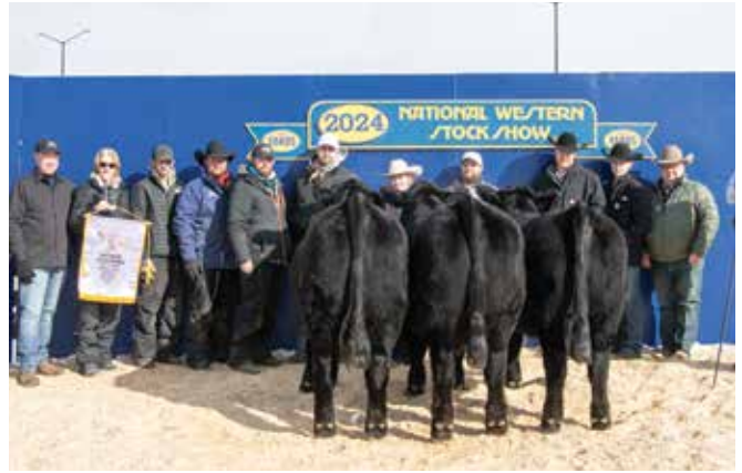
2024 NWSS Reserve Grand Champion Pen of Three Purebred Simmental Bulls