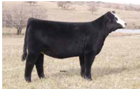
BF MISS CRYSTEEL TANGO $114,000 Maternal Granddam of Lots 103 & 104