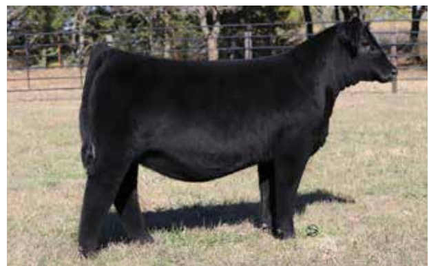
BEJV MS PROFIT J008 | $90,000 Maternal Sister to Dam of Lot 9