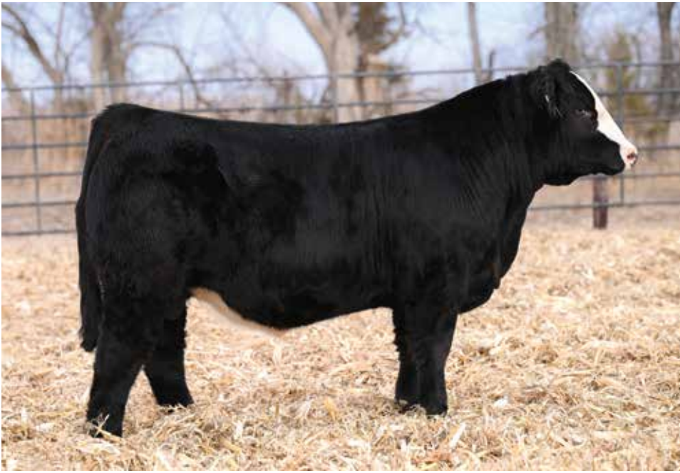
LOT 7 | GPG MOTIVE 49M