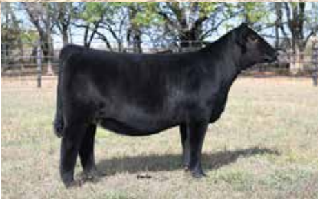
FRKG COUNTESS 924J $225,000 Dam of Lot 6