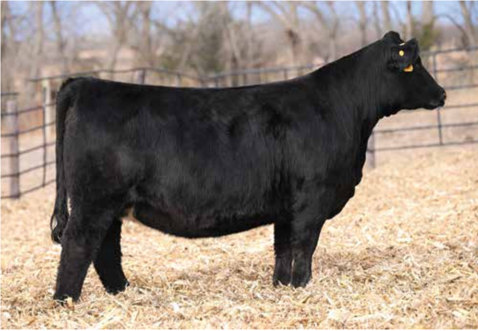
LOT 108 | FRKG MISS CHATTER 925L