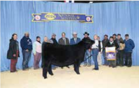
FRKG COUNTESS OF 948 11K 2024 NWSS Grand Champion Purebred Simmental Heifer Full Sister to Lot 1