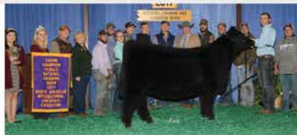
JSUL WHO DAT SULTRY 6215D ET DAM OF LOT 9