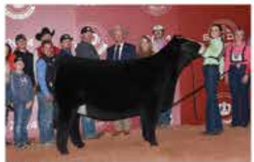
JSUL ROSIE 3418L FULL SISTER TO LOT 18