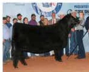
JSUL OH BOY REBA 0267G DAM OF LOT 40