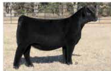
STCC NOBODY'S FOOL 027K $220,000 FULL SISTER TO LOT 29