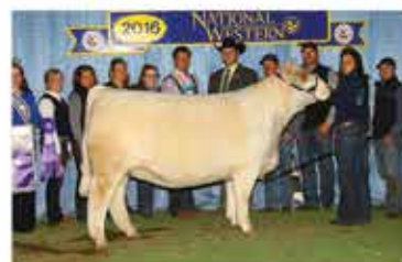
TR MS BERKLY 4711B ET DAM OF LOT 16

DUE TO CALVE EARLY MARCH TO SANKEY TRADING FAVORS (AAA: 20705429).