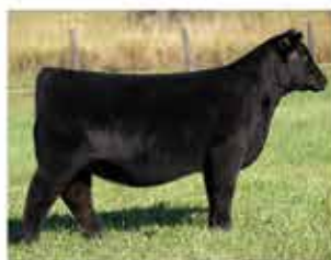
JSUL WOAH 4310M $78,000 MATERNAL SISTER TO LOT 42

JSUL Who's Whitney 4539M is a high caliber show heifer prospect that will be the perfect stocking stuffer for a showman with purple dreams. She is built with quality all the way through her phenotype, she is a super balanced female that offers an abundance of center body mass and capacity, and is deceptively powerful when you get behind the cattle. 4539M is bred to be elite! As her pedigree would suggest, it comes as no surprise that she is built with as much class, style, and presence. A very high-quality female that is destined for greatness! She is a direct daughter of JSUL Who Dat Whitney 091H, the 2021-2022 Chianina Show Heifer, and another generation back you will find the American Royal & NAILE Supreme Champion Female, JSUL Who Dat 1602Y. She too is a maternal sister to JSUL Woah 4310M, Reid Utterback's Reserve Division 1 Percentage Simmental Female at the 2024 North American, this is a cow family on the cusps of greatness!