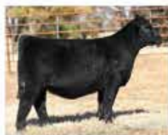
B C R BEAUTIFUL 310K $80,000 FULL SISTER TO LOT 30 & 31