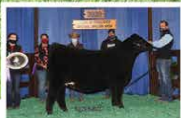
JSZC TSSC LARISSA 49G ET DAM OF LOT 13