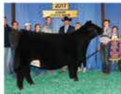
HARA'S PRINCESS 12D DAM OF LOT 26

The dam of this W/C Style 69E "Family Tradition" daughter, Hara's Princess 12D remains one of the most impressive show heifers to every step foot out of Hagerstown and onto the green chips of Louisville. She was slapped the Grand Champion Percentage Simmental Female at the 2017 North American, and was a serious contender for the Supreme Champion title, in the years before a top 5 was selected. No introductions need to be made for the MR HOC Broker x Hara's Hairietta mating that backs the 12D donor, as there are multiple full sisters to her that have built the programs of the show cattle business's leading firms. Maternal sisters to S&S Cowan She's A Princess include the Supreme Champion Female at the 2021 Colorado State Fair and multiple high sellers for the program! Latch onto a Percentage female that is loaded with cow power from either side of her pedigree, her intriguing build, beautiful blaze and incredible generating potential nominate her to the top of the list for serious ROI generating.