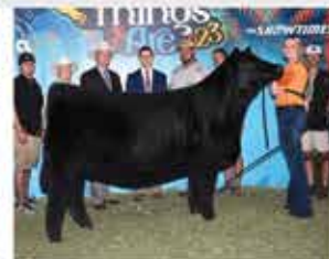
JSUL SAM IS WISE 1552J FULL SISTER TO LOT 21