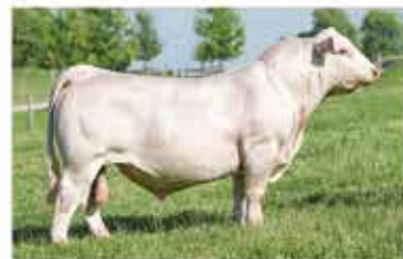
BOY OUTLIER 812 ET PLD FULL BROTHER TO LOT 16