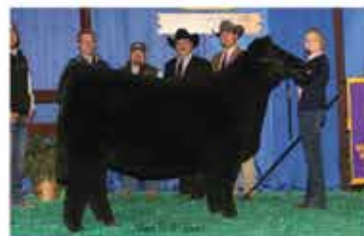
JSUL WHO'S DAT STINE 826F DAM OF LOT 43

JSUL GSMC Who Dat Stine 498M ET is a Chianina female that does so many things right. She is built soft in her underline, bold about her upper ribcage shape and has a maternal look of quality from the profile that simply cannot be denied. Her presence does not go unnoticed, as she ties high at the top side of her neatly laid in shoulder. The sweep and turn to her center body is textbook, and there is no denying the athleticism she offers when set into motion. Her quality proves that this set of open show heifer prospects is far from a group of left overs, as she has the skillset to sort to the top of the April born class in a hurry! The dam of 498M, JSUL Who's Dat Stine 826F, had a very decorative show career in her own right, being the Champion AOB at the 2019 American Royal, Champion Chianina in the Open and Junior shows at the 2019 NAILE, as well as the Champion Chianina at the 2020 NWSS.