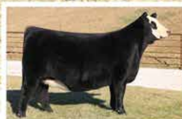
JBSF PROUD MARY 317C LEGENDARY DAM OF LOT 17