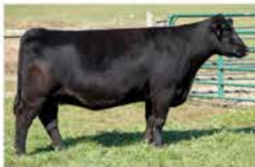
SSF ELLEN 1269 DAM OF LOT 3