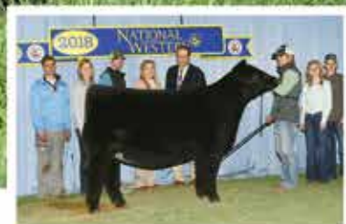
PEINE/GS ROSIE 677D DAM OF LOT 18