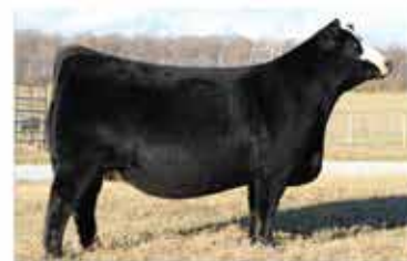
JSUL LEAPIN MARY 8108F - MANY TIME CHAMPION ACROSS THE MIDWEST