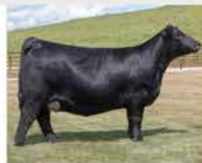
WPRF WISE LOLA 620D DAM OF LOT 21