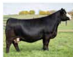
HILB AMAZING GRACE E928 DAM OF LOT 24

S&S H/W Simply Amazing is a full sister to the promotional sire, and Champion Percentage Simmental Bull at the 2021 American Royal, S&S TSSC Limitless 041H. Stemming from the tenured, HILB Amazing Grace E928 donor means that you can trust that the quality is built in right from the foundations. Her