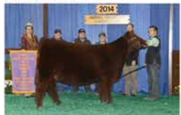
SULL WHO DAT GINGER 3241A FULL SISTER TO LOT 4