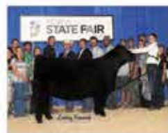
BRAMLETS BEAUTIFUL E742 MATERNAL SISTER TO LOT 30-32