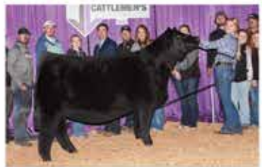
JSUL TSSC LADY IN BLACK 2181K FULL SISTER TO LOT 18