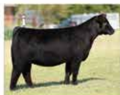
FULL SISTER TO LOT 28

An impressive set of full sisters from the champion producing, W/C Relentless 32C and out of the Guyer family's North American Champion, TSSC Who's Lizzo 907G that stems from the legendary mating of Colburn Primo 5153 and JSUL Who's Playing 6973D ET. The family tree of these females aligns several of the most successful cow families and individuals the show cattle business has seen in the past decade. We see lots of resemblance in this pair to their dominant mother, they are so striking from the side, being long and high tying about their head and neck junction, so square in their build and balanced in their overall design. They provide a very interesting foundation for a show heifer breeding program, giving a great jumpstart to a Simmental program with the opportunity to raise high percentage cattle in the first generation.