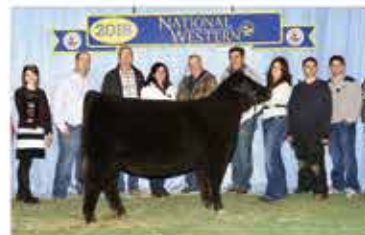
SCC PHYLLIS 052 MATERNAL GRANDDAM OF LOT 2