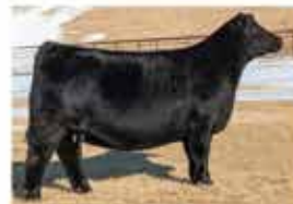
BAILEY'S PROFIT'S DREAM DAM OF LOT 23