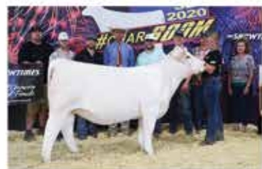
BOY MARILYN MONROE FULL SISTER TO THE DAM OF LOT 15