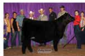
JSZC TSSC LARISSA 49G ET PROLIFIC DAM OF LOT 44