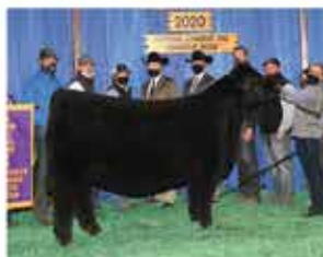
TSSC WHO'S LIZZO 907G FULL SISTER TO LOT 8