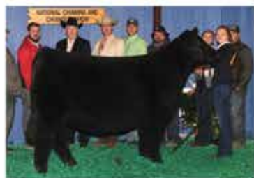
JSUL JAZZY JALYNN 750E FULL SISTER TO THE DAM OF LOT 43