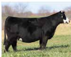
NANCY FULL SISTER TO LOT 19