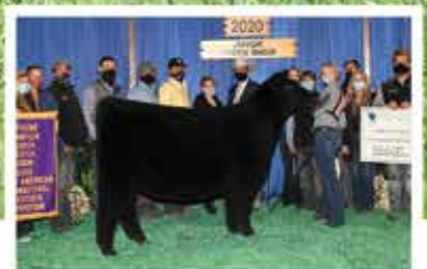
JSUL WHO DAT DARLING 902G ET FULL SISTER TO LOT 5