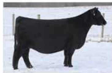
SCC SCH TSSC PHYLLIS 8422 DAM OF LOT 2

DUE TO CALVE EARLY MARCH TO SANKEY TRADING FAVORS (AAA: 20705429).