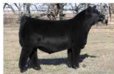
STCC TECUMSEH 058J - $620,000 MATERNAL BROTHER TO LOT 29