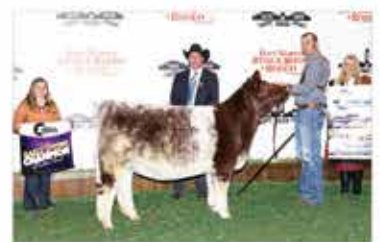
PIONEER 261 ET - 2023 FWSS RESERVE GRAND CHAMPION SHORTHORN HEIFER - FULL SISTER TO LOT 14

DUE TO CALVE MID JANUARY TO CONLEY NO LIMIT (AAA: 19290775). SEXED FEMALE SEMEN.