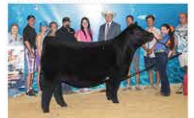
JSUL WHO DAT SPOT 3244L FULL SISTER TO LOT 5

DUE TO CALVE MID JANUARY TO S A V BRILLIANCE 8007 (AAA: 16107774). SEXED FEMALE SEMEN.