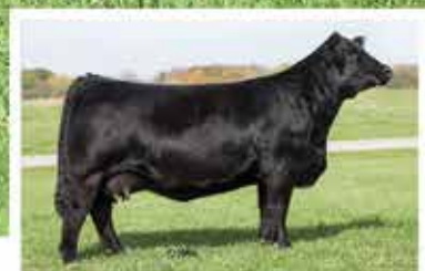
HF SERENA LEGENDARY DAM OF LOT 29

DUE TO CALVE MID JANUARY TO CONLEY NO LIMIT (AAA: 19290775). SEXED FEMALE SEMEN.