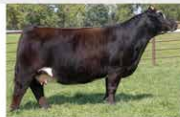
MISS PENNY 15B