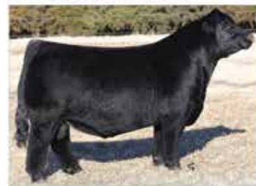
JSUL SOMETHING ABOUT MARY 8421 MATERNAL BROTHER TO LOT 17