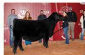
TSSL SOMETHING SPECIAL 2024 AMERICAN ROYAL GRAND CHAMPION LIM-FLEX HEIFER - MATERNAL SISTER TO LOT 44

There may not be a more progressive, and dominating donor in our lineup right now than the mother of this high percentage Limflex female. JSZC TSSC Larissa 49G ET has been a blessing to our program, and is evolving as a dominating force in not only the Limousin breed, but the show heifer business as a whole. For the short years she has been in production, she is quickly encroaching on the million-dollar revenue mark, and her daughters have been and continue to be sourced by the most competitive show families in the nation. This daughter of the $100,000 J6 We The People 411J offers Limousin enthusiasts a higher breed percentage than the Angus sired daughters that we typically offer, and not only looks to be a promising show heifer prospect, but sanctions herself as a very intriguing breeding piece beyond that.