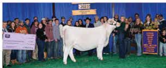
LMAN MS. SHELLEY 251K FULL SISTER TO LOT 45

SILVEIRAS STYLE 9303 JSZC TSSC LARISSA 49G ET RIVERSTONE CHARMED