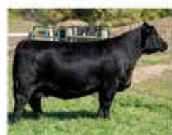
LAZY H BAR FOREVER LADY 36D - DAM OF LOT 25

A direct daughter of the Lazy H Bar Forever Lady 36D donor female. 36D is a SimAngus member of the immortal Lazy H Bar Forever Lady 5001 cow family that has been a dominate supplier of superior show heifer genetics. She was a member of the Top 5 Supreme Female lineup at the Badger Kickoff and landed in the Top 10 Overall Females