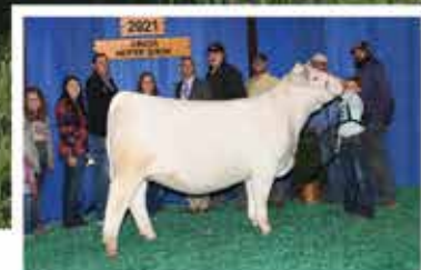
BOY SHERRI 088 ET PLD DAM OF LOT 15