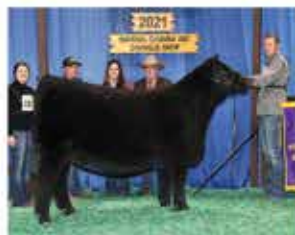
TSSC I'M GONNA BE 048H FULL SISTER TO LOT 7