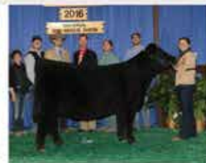
MIA DAM OF LOT 19