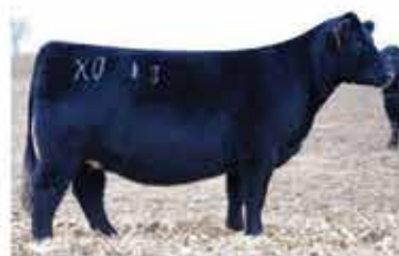
TSSC MS TYRA X013 DAM OF LOT 11