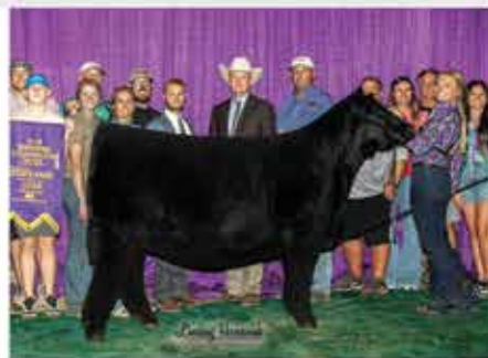
S&S COWAN DUA LIPA 758L MATERNAL SISTER TO LOT 33-39

Junior Nationals and the Supreme Female banner at the 2018 Keystone International Livestock Exposition in Pennsylvania. Yet the most prestigious days have been in production, generating over $2 million of lifetime earnings, across an array of Angus sired matings, and many will attest the 24 Karat mating is her most potent. This most recently includes the Encore sired daughter of Foxy that the Henrickson family has Supreme Champion Female with at the 2024 Indiana State Fair. Unfortunately Foxy has passed, and so the inventory is depleting. If you don't have a daughter of Foxy working for your program, then there is no point in waiting around, they are a treasured piece of SimGenetic property that needs to be secured.