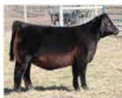
$61,500 DAUGHTER OF CONLEY NO LIMIT FULL SISTER TO LOT 32