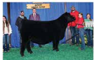
TSSL SOMETHING SPECIAL FULL SISTER TO LOT 13