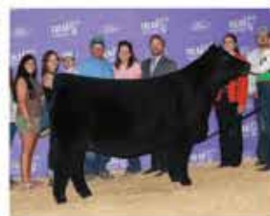
JSUL REBA 312L MATERNAL SISTER TO LOT 40