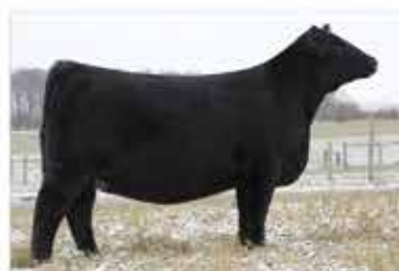
JBSF PLENTY FOXY 12E DAM OF LOT 22

A meeting of two legends in the Simmental business happens in the pedigree of S&S TSSC Shakira 3009L. This purebred female comes with a pedigree that should interest progressive Simmental show heifer producers, and offers a baseplate to a very interesting breeding career. No introductions are needed for JSUL Something About Mary 8421, as he has singlehandedly dominated the backdrop over the past several years, with his daughters being some of the most demanded in the production sales of the nation's top firms. JBSF Plenty Foxy 12E has been a program cornerstone, and the HOC MR Broker daughter has generated a long list of success stories for the S&S prefix. 3009L is set to break out of the gate running, with a pregnancy sired by sexed female semen of Conley No Limit, this sounds like a recipe for success.