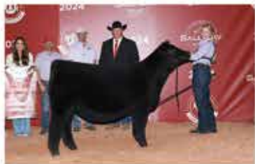
TSSC WHO'S GONNA PLAY 4015M ET MATERNAL SISTER TO LOT 6-8