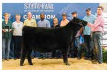
M C BLACKCAP 6083 DAM OF LOT 1