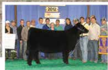
JSUL WHO DAT 1602Y FULL SISTER TO LOT 4

Selling 50% embryo interest with the option to double the hammer price and own 100% embryo interest. In the event that the winning bidder doubles their bid, Schaeffer Show Cattle will reserve the right to 1 successful flush with a minimum of 6 transferrable embryos.