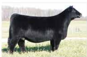
JSUL WHO'S PLAYING 6973D ET DAM OF LOT 6-8