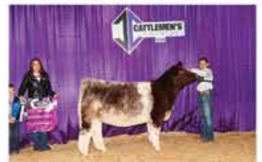
PIONEER 261 ET - 2023 CATTLEMEN'S CONGRESS DIVISION CHAMPION SHORTHORN HEIFER - FULL SISTER TO LOT 14