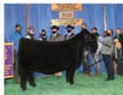
TSSC WHO'S LIZZO 907G DAM OF LOT 27 & 28

An impressive set of full sisters from the champion producing, W/C Relentless 32C and out of the Guyer family's North American Champion, TSSC Who's Lizzo 907G that stems from the legendary mating of Colburn Primo 5153 and JSUL Who's Playing 6973D ET. The family tree of these females aligns several of the most successful cow families and individuals the show cattle business has seen in the past decade. We see lots of resemblance in this pair to their dominant mother, they are so striking from the side, being long and high tying about their head and neck junction, so square in their build and balanced in their overall design. They provide a very interesting foundation for a show heifer breeding program, giving a great jumpstart to a Simmental program with the opportunity to raise high percentage cattle in the first generation.