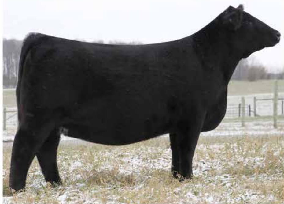
JBSF PLENTY FOXY 12E - DAM OF LOT 33-39