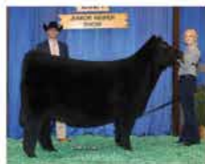
JSUL WHO DAT WHITNEY 091H ET DAM OF LOT 42