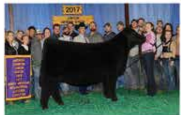
JSUL WHO DAT RAPTOR 6976D ET FULL SISTER TO LOT 4