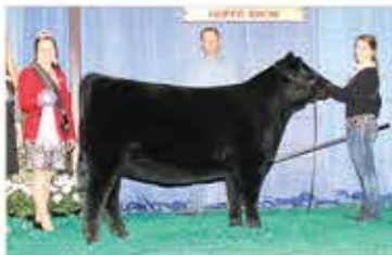
PVF ELLEN 1185 MATERNAL GRANDDAM OF LOT 3