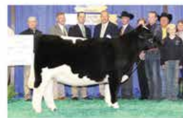
SULL JALYNN 0904 - LEGENDARY MATERNAL GRANDDAM OF LOT 10

The stars of the show cattle business have aligned in the pedigree of this female. She truly incorporates several of the most recognizable and successful individuals of the past 20 years into a single pedigree. Maternally you will find the dominating combination of Who Da Man on the ever recognizable, SULL Jalynn 0904 female that was the 2011 American Royal and NAILE Supreme Champion Breeding Heifer. There are several full sisters to the Who Da Man x 0904 female that are standing in the donor pen in Dunlap, including JSUL Sassy Jalynn 7507E that was the Champion AOB at the 2018 NAILE and American Royal and another that was the 4th Overall Breeding Heifer at the 2019 Iowa State Fair 4-H Heifer Show. Certainly a show cow generator selling here.