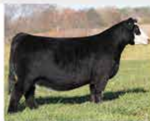
AMERICA - FULL SISTER TO LOT 19 & DAM OF LOT 20