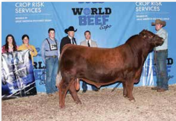
TC/HOC LONE STAR 22K

2023 World Beef Expo Reserve Supreme Champion Bull $37,500 Son of Lot 19