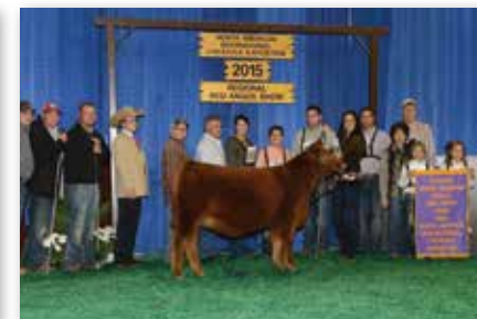
3ACES FIONA 3605 2015 NAILE Reserve Grand Champion Red Angus Heifer Dam of Lot 4