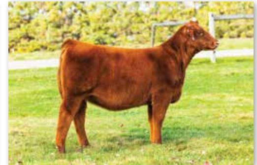
TC SUGAR L39 - Full Sister to Lot 6