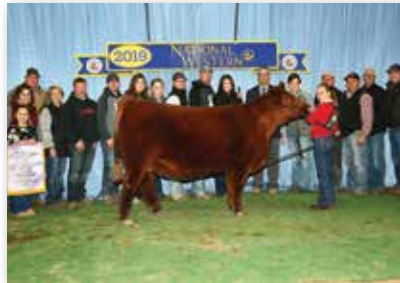
TC HANNA 105E

ProS: 90 HB: 37 GM: 53 CED: 12 BW: 0.9 WW: 67 YW: 111 MILK: 28