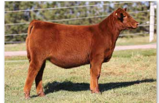
TC KASHMIR 112K - Maternal Sister to Lot 18