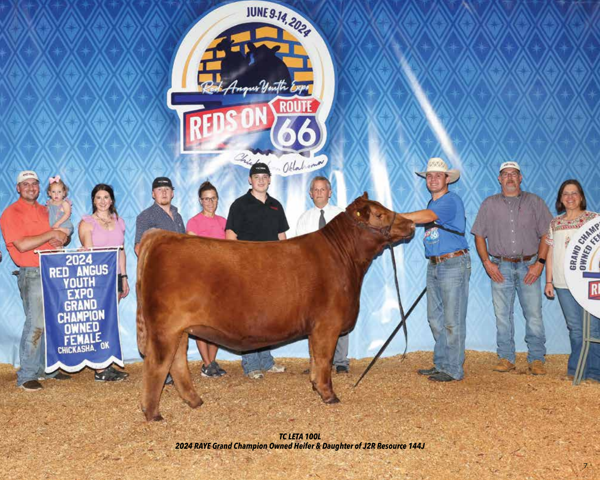
TC LETA 100L 2024 RAYE Grand Champion Owned Heifer & Daughter of J2R Resource 144J