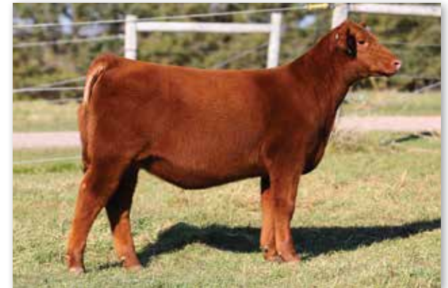
TC SUGAR K89 - Maternal Sister to Lot 6-9