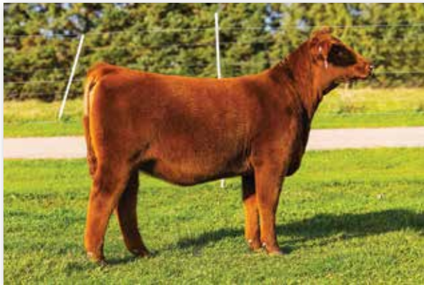
TC MS SUGAR L99 - Maternal Sister to Lot 6-9