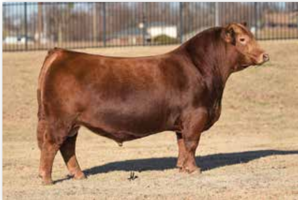
TC TUCKER 65J - Sire of Lot 17 & 18