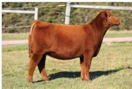
TC SUGAR K7 - Maternal Sister to Lot 6-9