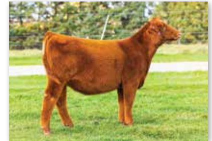
TC SUGAR L521 Full Sister to Lot 24 & 25

SIRE PIE DEEP CREEK 120 MEADO-WEST MONTANA CREEK 413 DKK MS MONTANA POWER DAM 3 ACES SIDEWAYS TC SUGARCUP 02Y MEADO-WEST LUANNA