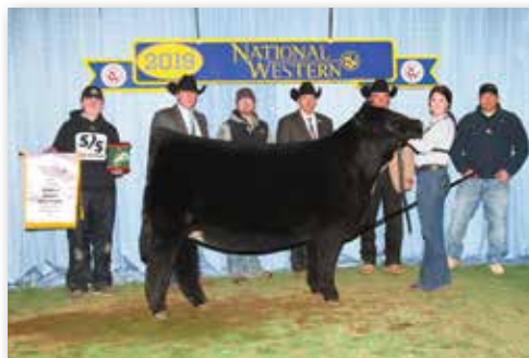
STELLA 08E 2019 NWSS Reserve Grand Champion Purebred Simmental Heifer Dam of Lot 30 & 31