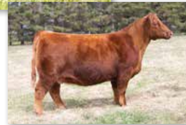
WEBR MS ELLIE 1024 Legendary Dam of Lot 12

The one we have always been looking for from combining MLK Big Foot and WEBR Ms Ellie 1024, this February born female is the best we have had from this potent mating. WEBR Ms Ellie 1024 remains one of the most decorated females in the entire Red Angus directory, she has had close to a decade of dominance of the winner's circle, and the phenotypic quality she transmits has proven to be timeless. She continues to generate the right kind, and her daughters are taking on the role of protecting the legacy she has built. This is the only direct daughter of 1024 of the offering, and is one that makes the trip worth it. Seldom do individuals come along that are this unique in their build, so genuine in their structural integrity and so seamless about the transitions between their pieces. As you break 27M down it becomes evident that there is little further to desire, she comes with a big circumference of foot and bone, a fluid set of joints and shaggy hide. All built to carry the extra volume and mass that she has matured with. This is one that needs to be inspected in the flesh as she comes flawless in her basic build, yet excels in regard to all the extras that are trendy, it's not often can you have both. Incredible phenotype and the most powerful of cow families merge here, and has delivered a special one.