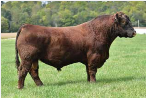
MLK BIG FOOT - Sire of Lot 12 & 13