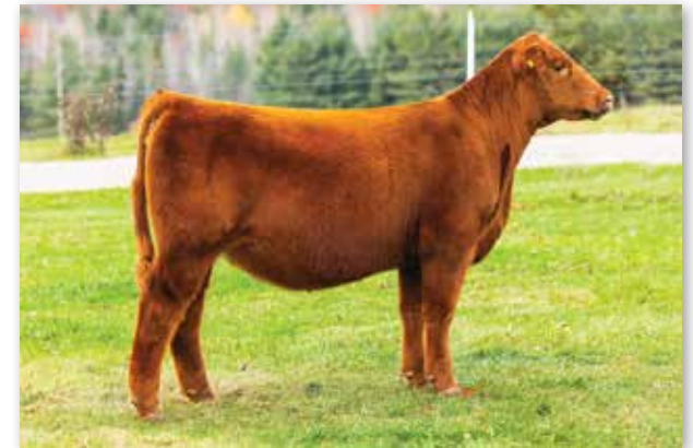
TC TOPEKA 68L - $14,000 Full Sister to Lot 14-16