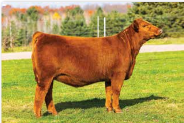
CB TC RUBY 25L - Maternal Sister to Lot 3