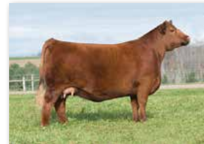
ORAR TOPEKA RB25 Dam of Lot 22

ProS: 75 HB: 52 GM: 23 CED: 5 BW: 2 WW: 52 YW: 81 MILK: 19