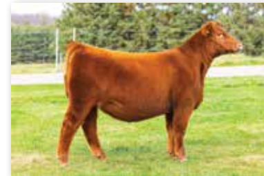
TC MISS ELLIE 11L $37,500 Maternal Sister to Lot 12