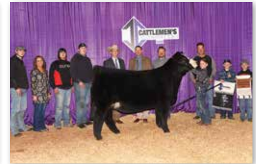
WEIS MISS LILLY 35J 2023 Cattlemen's Congress Grand Champion Purebred Simmental Heifer Maternal Sister to Dam of Lots 30 & 31