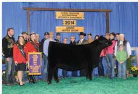
TOP LINE LADY 3300 2014 NAILE Grand Champion Junior Angus Heifer Maternal Granddam to Lot 28