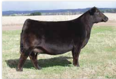
J6C WEIS MISS COCO 16F - Dam of Lot 29