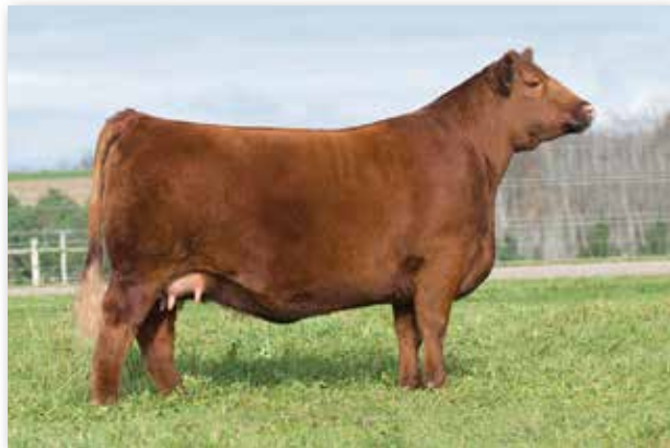
ORAR TOPEKA RB25 - Dam of Lot 14-16