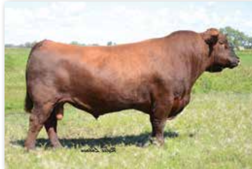
SIX MILE GAME FACE 164Y Maternal Brother to Dam of Lot 20

AI BRED 4/19/24 TO LSF DLL LOCOMOTION (RAAA: 4620365). PE 5/20/24-8/1/24 TO TC RESOURCE 130L (RAAA: 4909866).