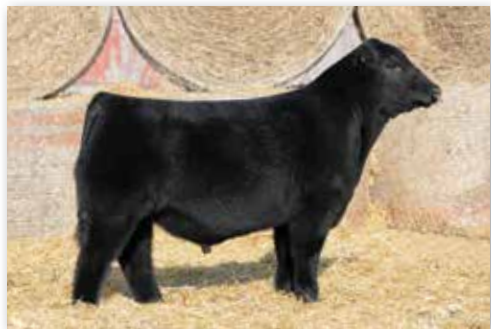
CLF 24 KARAT 29K - Sire of Lot 28