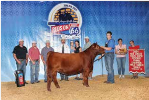
TC ELLIE L124

2024 RAYE Reserve Grand Champion Bred & Owned Heifer Maternal Sister to Lot 11