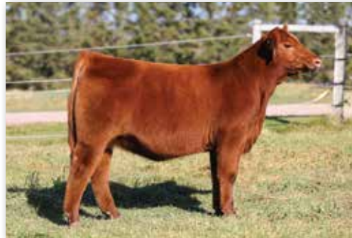
TC SUGAR K78 - Full Sister to Lot 6

The leading cow prospect of the daughters of our frontrunning, Sugarcup cow family is TC Sugar M89. She is a full sister to a trio of show heifer prospects that sold to the Howard, Kronebusch & Ward families last year, along with a $16,500 heifer that Tyler Wilson purchased out of the 2022 sale and the lot 24 & 25 bred heifers in this sale. This is a mating that just flat works, and we think offers the peace of mind that there will be consistency built in with her generating capabilities down the road. In the flesh you will find a big bodied, round ribbed, soft made female, that remains wide pinned and based, but still gives a feminine look from the side, and ties high with a neatly chiseled head and neck design. Plain and simple this is just good quality stock, stemming from the one of best cow families we propagate from.