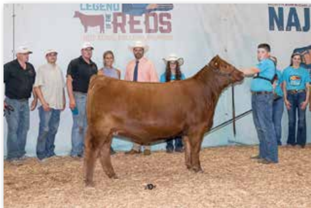
TC PRIMROSE 62J 2022 NAJRAE 4th Overall Owned Heifer Dam of Lot 5