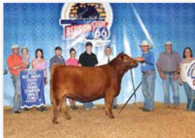
TC LETA 100L Maternal Sister to Dam of Lot 21

ProS: 97 HB: 58 GM: 39 CED: 11 BW: 0.9 WW: 58 YW: 88 MILK: 23