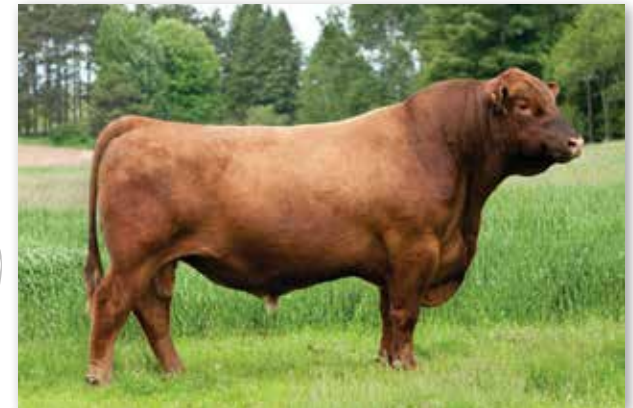
BHR DURANGO 1158 - Sire of Lot 14-16