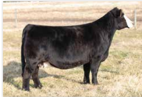
JPLF/RBS YOUR THE ONE "RUDY" Legendary Granddam of Lots 30 & 31

TC Stella M741 is the second of the Stella 08E daughters to sell, she was Tucker's LLSF Pays To Believe ZU194 granddaughter of the legendary, JPLF/RBS Your The One 'Rudy' female that stands at the forefront of the Weis Simmental donor pen. She found success all the way through her show tenure, but it was highlighted by being crowned the Reserve Champion Purebred Simmental Female at both the National Western Stock Show and Fort Worth Stock Show. This purebred female is built extra agile and comfortable in her joint work, she strikes an awesome pose from the side, and is as elegant headed and necked as you will find a Simmental female to be designed.