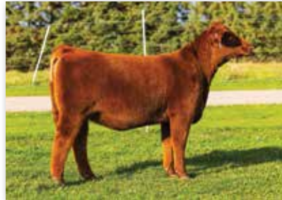
TC SUGAR L99 Full Sister to Lot 24 & 25

SIRE PIE DEEP CREEK 120 MEADO-WEST MONTANA CREEK 413 DKK MS MONTANA POWER DAM 3 ACES SIDEWAYS TC SUGARCUP 02Y MEADO-WEST LUANNA