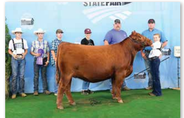
TC LOLA 28J 2022 MO State Fair Grand Champion Red Angus Heifer Maternal Sister to Lot 10