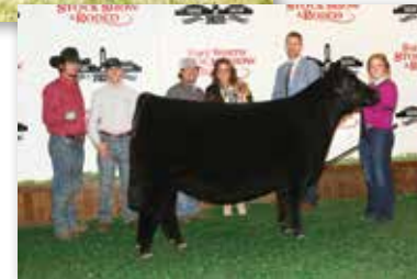
SELDOM REST PIN UP GAL 8134 2020 FWSS Grand Champion Angus Heifer Full Sister to the Dam of Lot 27