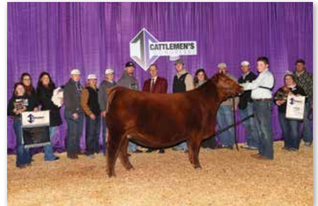
TC FANCY 09J

Every once in a while, animals come along that just know they are special, they do everything right, and just continue to jump past the maturity markers you dream they will make, TC Fancy 16M has been of a special status since day one. We think there is no boundary to the possibilities for this female headed forward, and we like to think there are few that can match the quality she is blessed with. The circumference of bone and foot in this animal is overwhelming, matching terms could also be used to describe the hip and back shape of this J2R Resource 144J daughter. Her dark cherry red hide only amplifies her body density, add these traits to her ability to set down her feet with a fluid and secure gait and we think the future of this one will be filled with banners and eventual dollar signs once she enters production. These claims stand up to the precedent set by her mother, as TC Fancy 09J was one of the most decorated females to come out of the program of the past couple of years, her victories include being the Reserve Grand Champion Female for Tucker at the 2023 Cattleman's Congress Open Show, and NAILE Junior Show, and the Grand Champion Red Angus Female in the Junior Show at the Cattleman's Congress. Dig your heels in here if you are ready to make waves in the Red Angus business. Retaining 50% embryo interest.