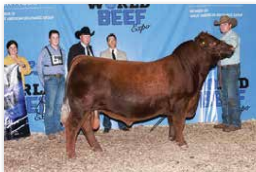
TC/HOC LONE STAR 22K 2023 World Beef Expo Reserve Supreme Champion Bull Sire of Lot 7-11