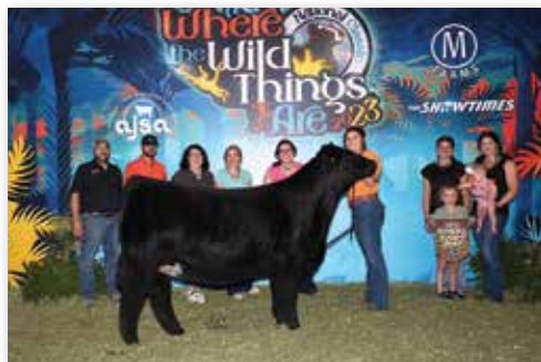
TCB STELLA 33K $52,000 High Selling Full Sister to Lot 30