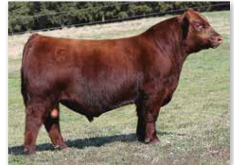
EGL GCC RED EAGLE E7194 - Sire of Lot 20