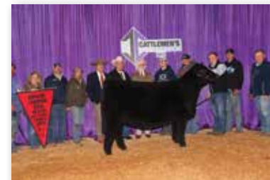
SELDOM REST PIN UP GAL 0103 2022 Cattlemen's Congress Supreme Champion Junior Breeding Heifer Full Sister to the Dam of Lot 27