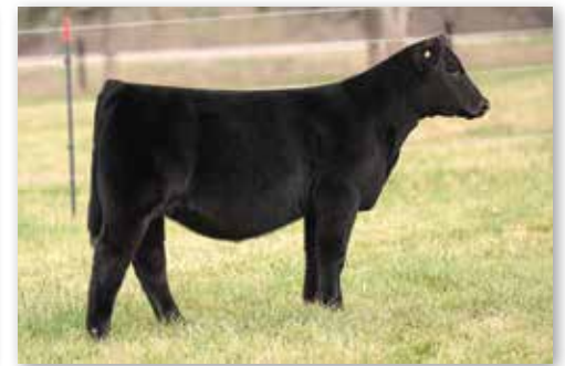
TC WEIS COCO L268 - Full Sister to Lot 29