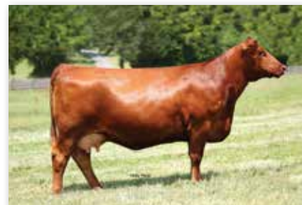
TC PHOEBE 14S 3rd Generation Dam of Lot 4

TC Fiona 90M represents the quality that we are turning to J2R Resource 144J to create, she has all the extras and big features that are needed to find success in the showing, but is built so correct at her foundation. 90M is certainly one of the densest bodied, and most expressive muscled females in the offering, yet you will still find she is chiseled about her head and neck, giving her an extreme wow factor! She has the big and soft running gear that you need to stand out, and we love the way that she ties all these fancy features together; it begins with the eccentric ear set and traces effortlessly all the way down her spine to a big and square pin set. The dam of lot 4, 3 Aces TC Fiona 3605 sold for $43,000 to Top Line Farms as a heifer calf, and was the Reserve Grand Champion Red Angus Female at the 2015 North American. A maternal sister to 90M was Andrew Meier's 3Aces Fiona 1037 that was slapped Reserve Champion Red Angus Female at the 2018 National Western Stock Show and raised his Champion Bred & Owned Female at this past years Red Angus Youth Expo.