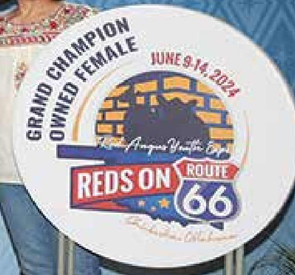
2024 RAYE Grand Champion Owned Heifer Congratulations Rex Howard!