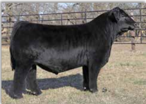
FRKG Victory 78J $210,000 Sire of Lots 16 –18