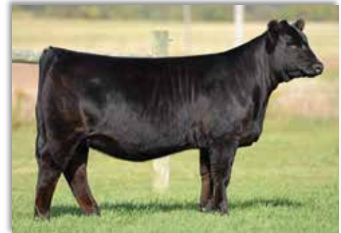
NFF Lady Lin K005 Maternal Sister to Lot 10