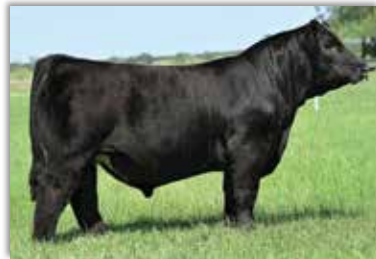
SWC NFFS Hoo-Rah 547H Sire of Lots 27 & 28