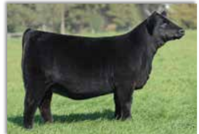
NFF ELLEN J004 Full Sister to Dam of Lot 2