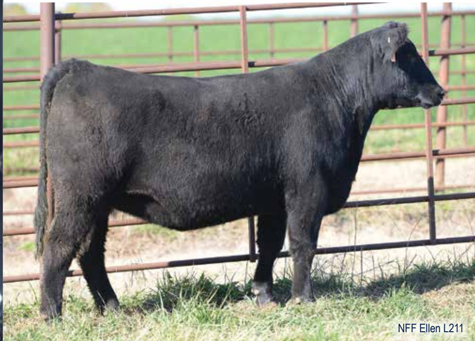
NFF Ellen L211