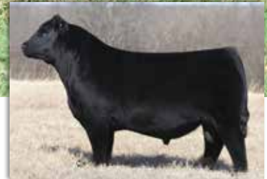
CENTURY Headliner 89 Sire of Lot 2