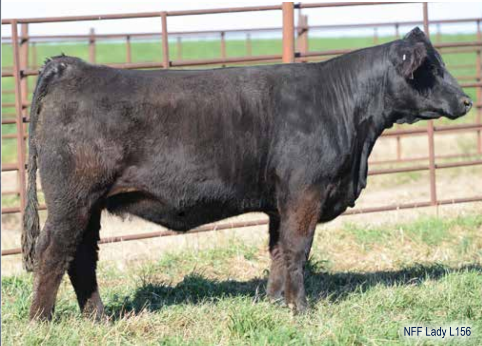
NFF Lady L156