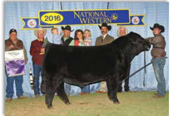
THSF Lover Boy B33 Sire of Lot 41