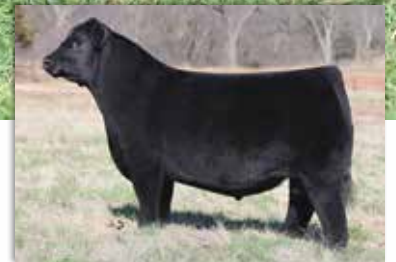
GATEWAY Follow Me F163 Sire of Lot 2