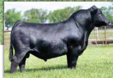
PVF Marvel 9185 Sire of Lot 1