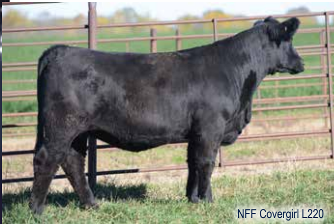
NFF Covergirl L220