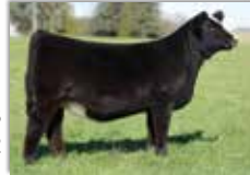
NFF Wicked J208 $33,000 Maternal Sister to Lot 22