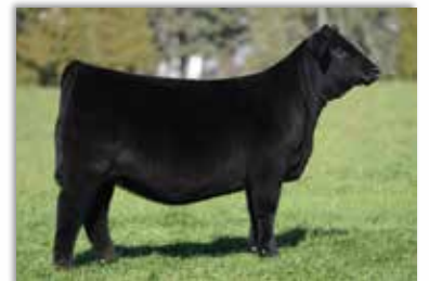
NFF Ellen J089 Full Sister to Lot 3