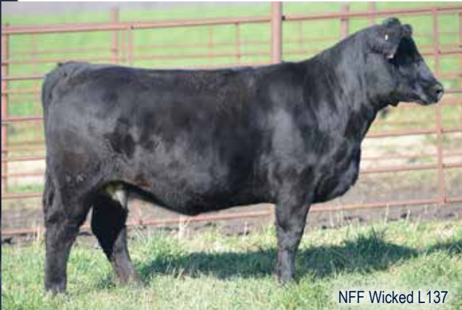
NFF Wicked L137