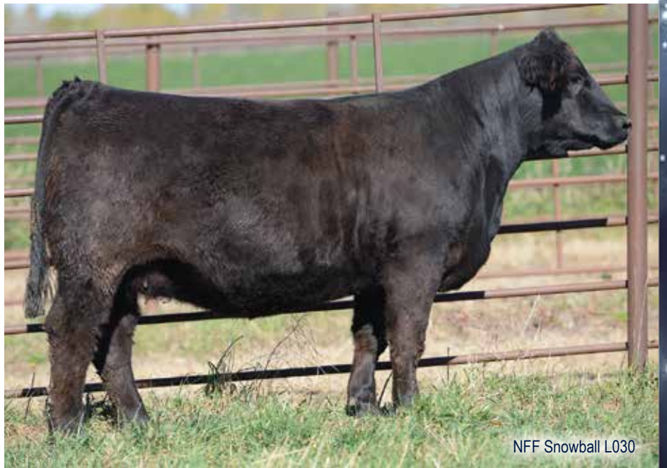
NFF Snowball L030