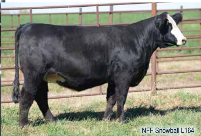
NFF Snowball L164