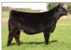
NFF Snowball G251 Maternal Sister to Lots 17 –19