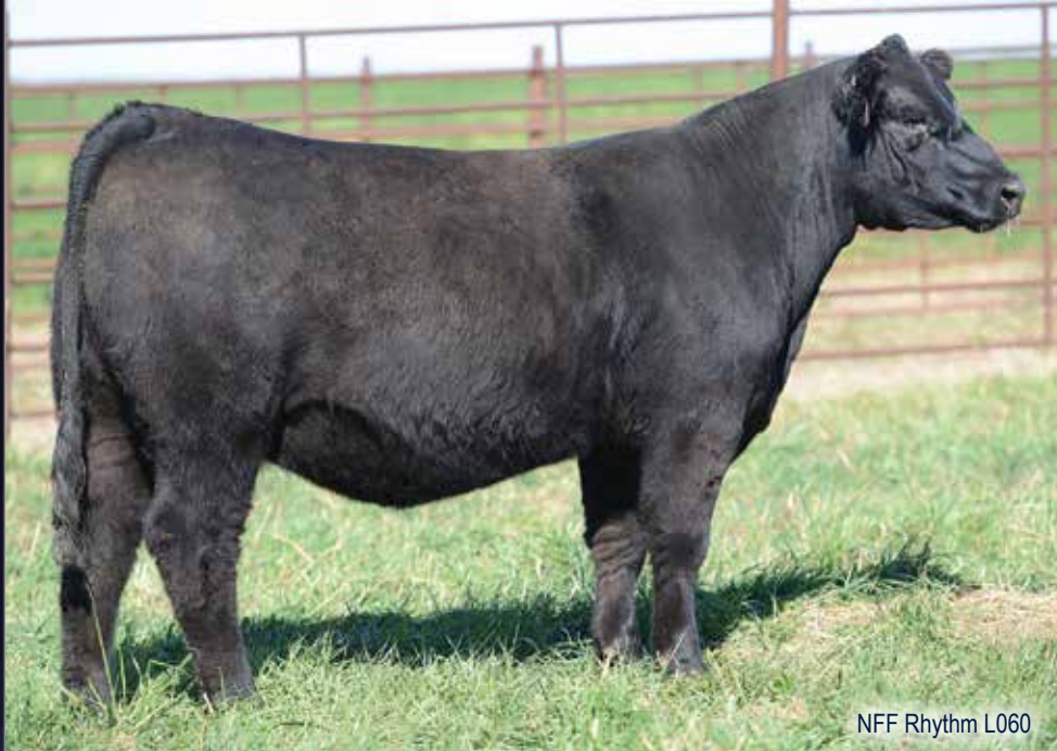
NFF Rhythm L060