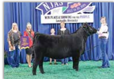
NFF T/R Ellen F181 2019 NJAS Division V Junior Champion Angus Heifer & Maternal Granddam of Lots 1, 4, & 5