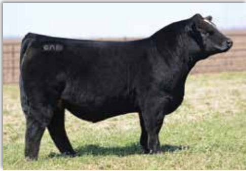
Wheatland Bull 954G Sire of Lot 12