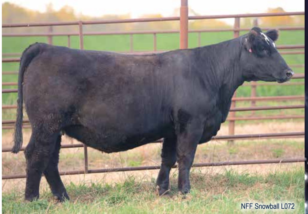
NFF Snowball L072