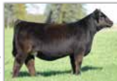
NFF Wicked J125 $21,000 Maternal Sister to Lot 22