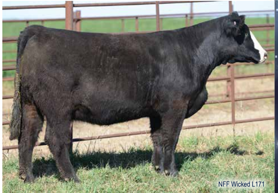
NFF Wicked L171