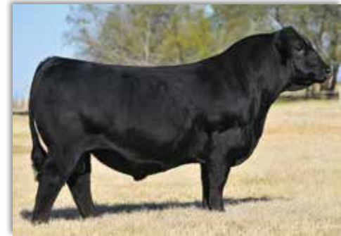
ES Right Time FA110-4 Paternal Grandsire of Lots 4 & 5