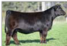
NFF Snowball L011 Full Sister to Lots 17 & 18