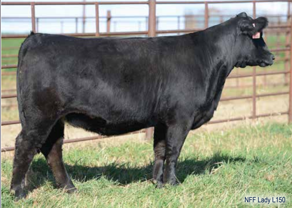
NFF Lady L150