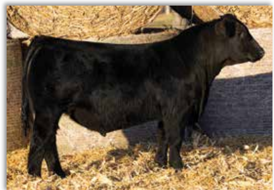
WEIS Lover Boy 214L Service sire to several females throughout the offering!