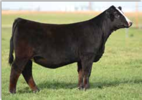
NFF Snowball K118 Maternal Sister to Lot 15