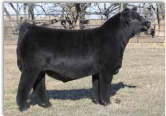
STCC Tecumseh 058J $620,000 Sire of Lot 25