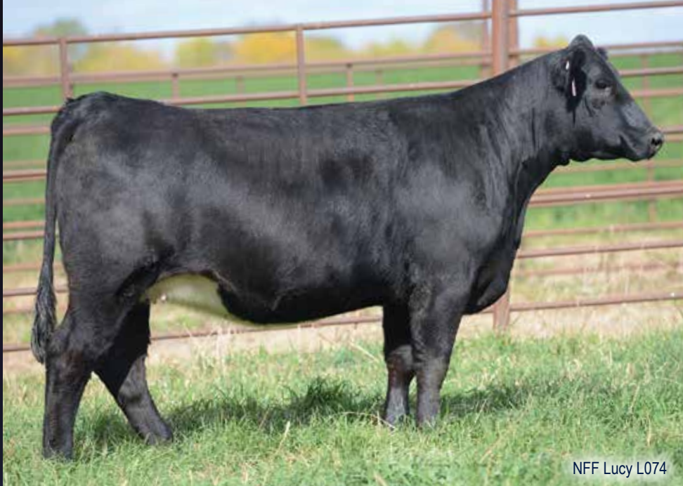
NFF Lucy L074