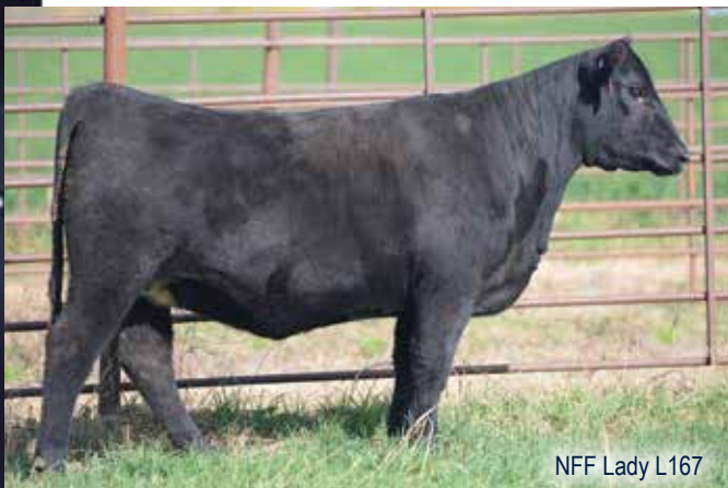
NFF Lady L167