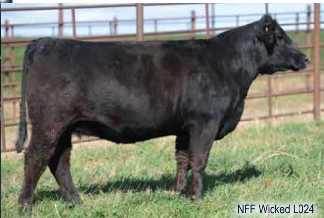
NFF Wicked L024