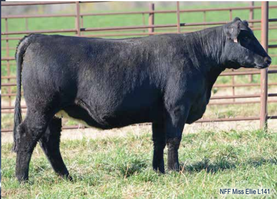
NFF Miss Ellie L141

Service sire of several females throughout the offering!