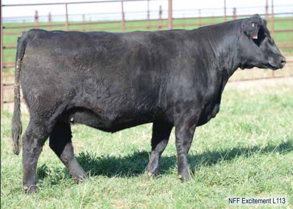
NFF Excitement L113