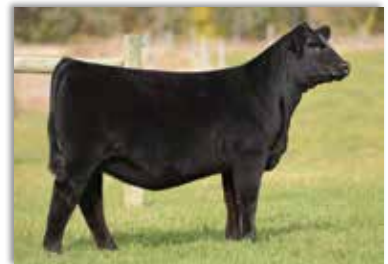
NFF Ellen K070 Maternal Sister to Dam of Lots 2 & 3