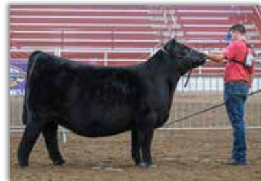
NFF Ellen K025 Maternal Sister to Dam of Lot 1