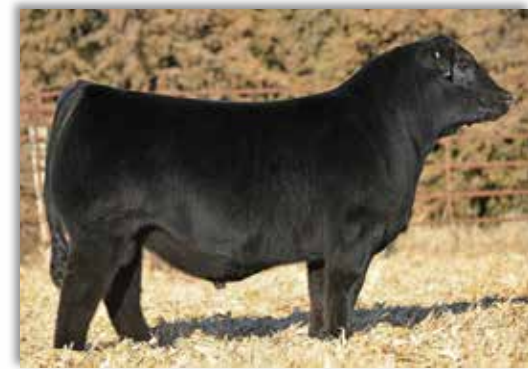
FRKG CKCC Platinum 009H ET $175,000 Sire of Lots 34 & 35