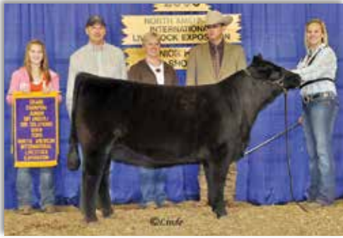
RCC-NFF WICKED 2009 NAILE Grand Champion Percentage Simmental Heifer Matriarch of the "Wicked" Cow Family!