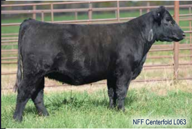
NFF Centerfold L063