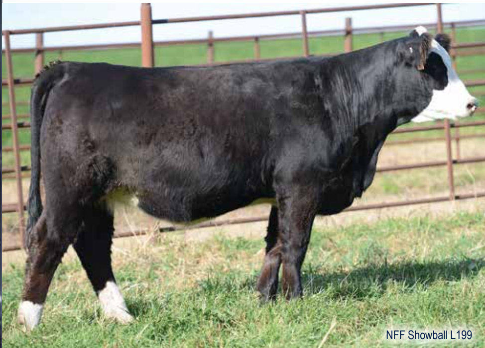
NFF Showball L199