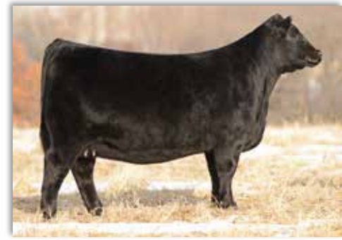
NFF T/R Ellen F181 Maternal Granddam of Lot 4