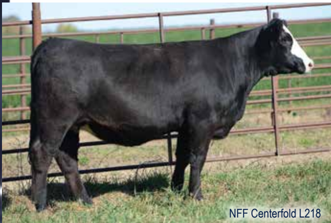
NFF Centerfold L218