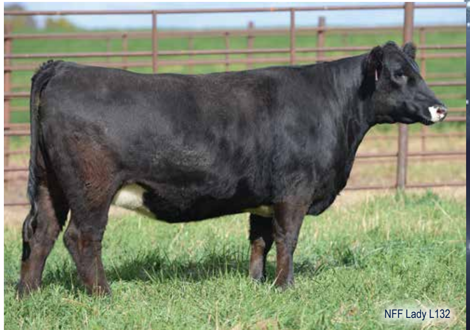
NFF Lady L132