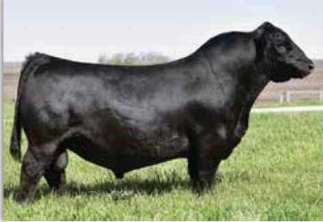
PVF Blacklist 7077 Sire of Lot 15