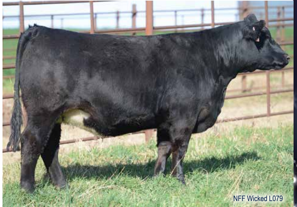
NFF Wicked L079