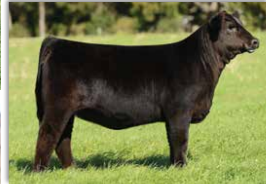
NFF Lady G295 Maternal Sister to Dam of Lots 29-32