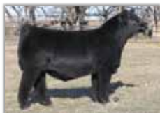
STCC Tecumseh 058J $620,000 Sire of Lot 19