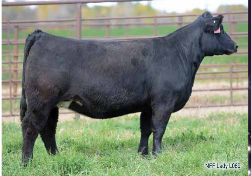
NFF Lady L069