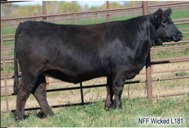
NFF Wicked L181