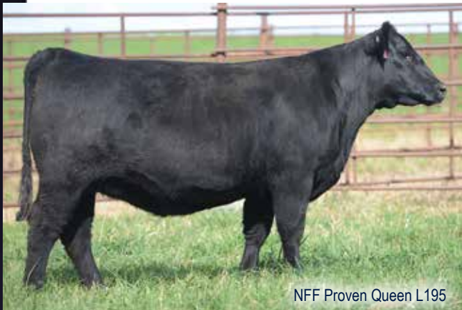
NFF Proven Queen L195