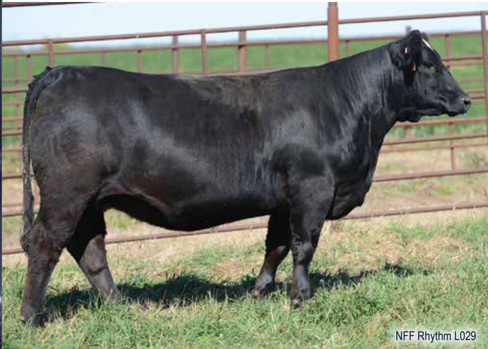
NFF Rhythm L029