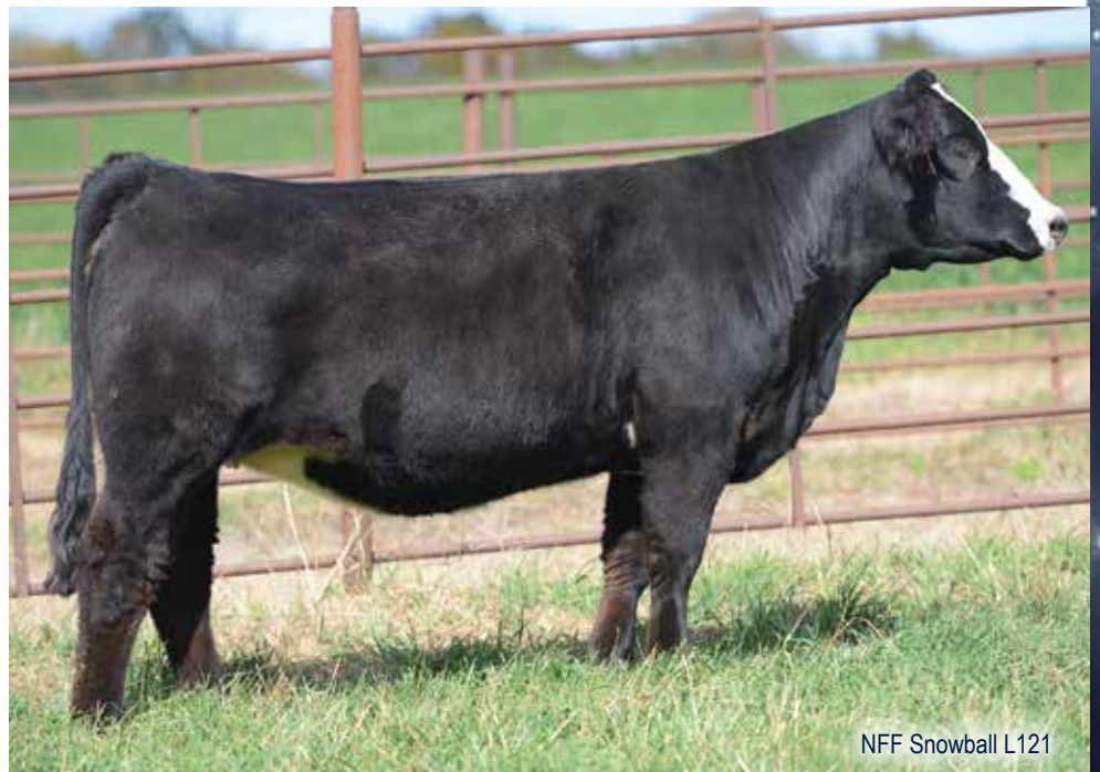
NFF Snowball L121