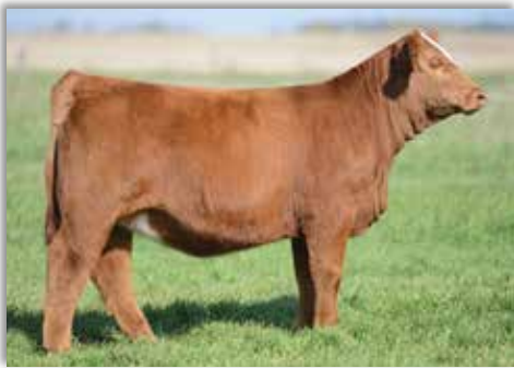
NFF Royal Pride L198 Member of the "Royal Pride" cow family!