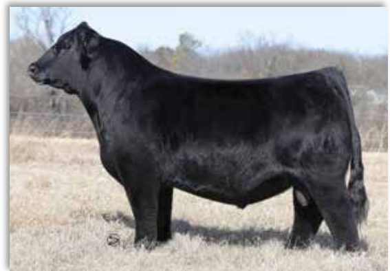
WHF/JS/CCS Double Up G365 – Sire of Lot 6

CE BW WW YW MCE MLK MWW STY CW YG MRB BF REA API TI