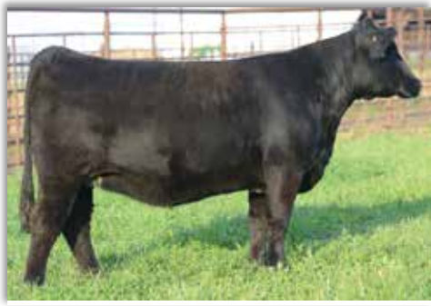
NFF Lady K089 Maternal Sister to Lot 29