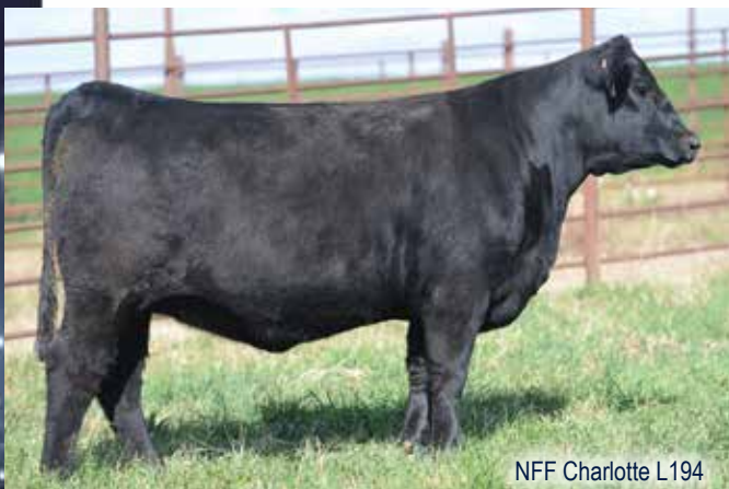
NFF Charlotte L194