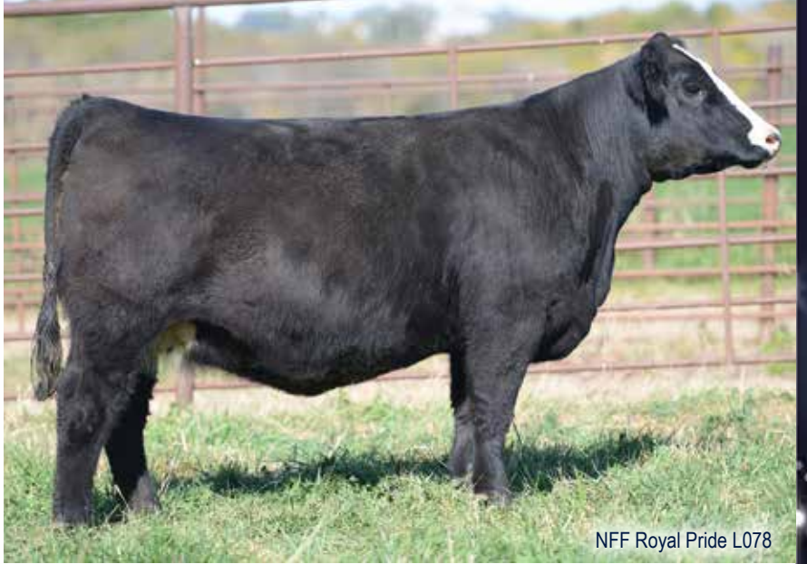
NFF Royal Pride L078