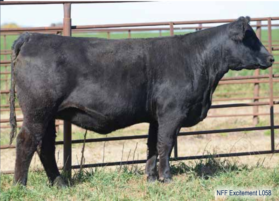
NFF Excitement L058