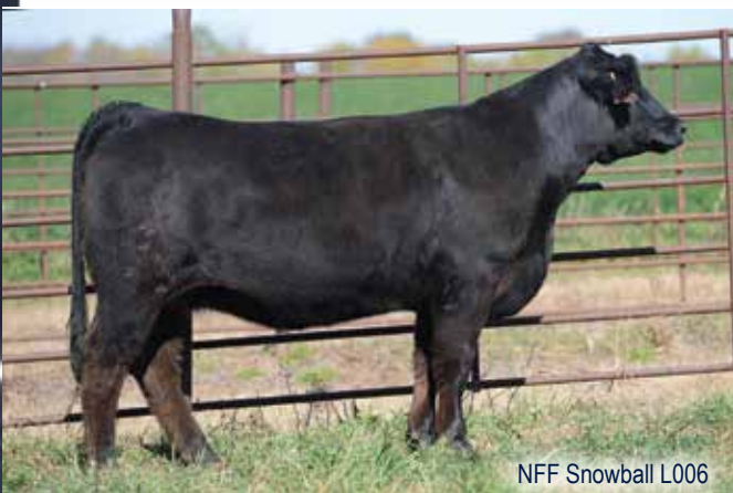
NFF Snowball L006