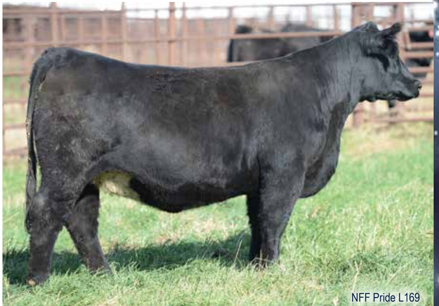
NFF Pride L169