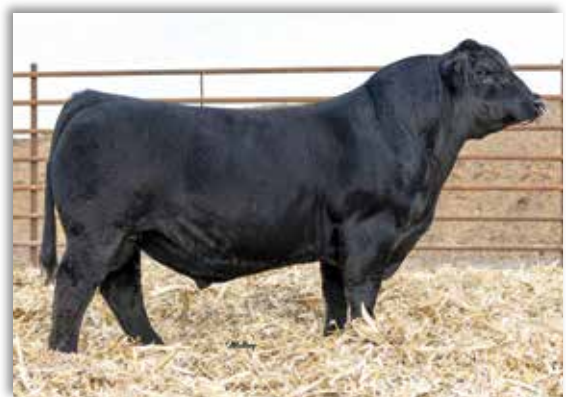
OMF Epic E27 – Sire of Lot 9

• DUE TO CALVE 1/8/25 TO SFI IN CHARGE K38 (ASA: 4113347). BULL CALF.