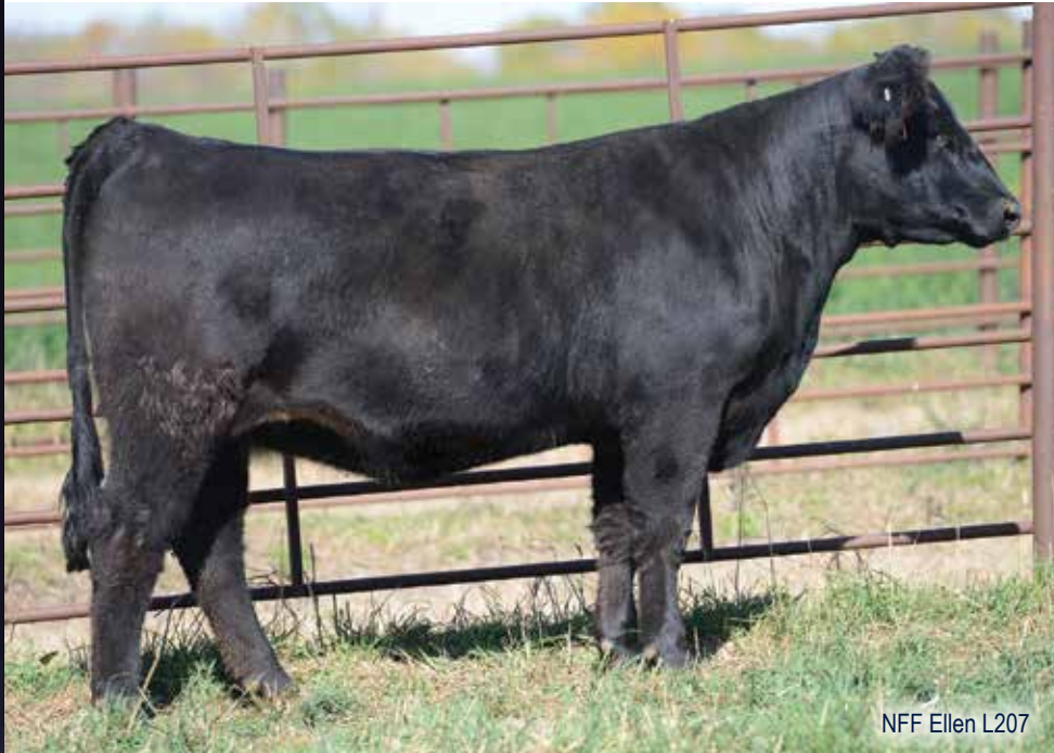
NFF Ellen L207