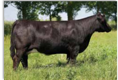
Rhythm 418P Legendary matriarch of the "Rhythm" Cow Family