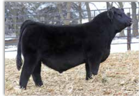
MLJM Patron 17H $87,500 Sire of Lot 7