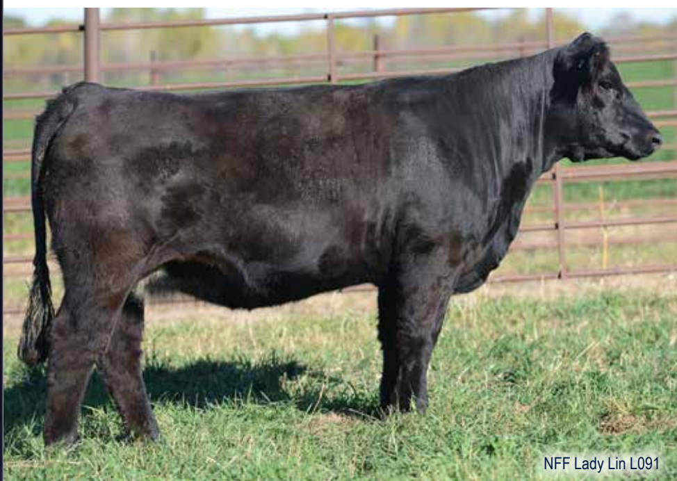
NFF Lady Lin L091