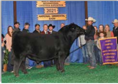
Rocking P Private Stock H010 Service sire of several females throughout the offering!