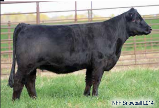
NFF Snowball L014