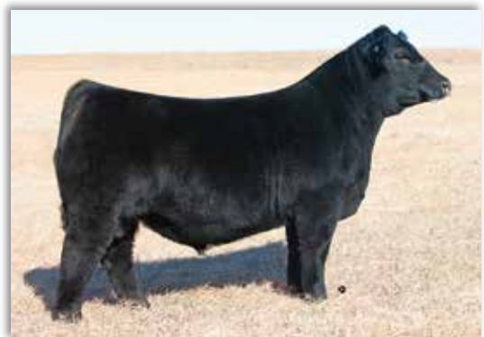
SFI LONGS In Charge K28 Service sire of several females throughout the offering!