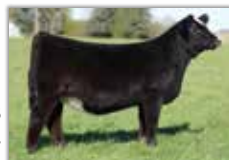
NFF Wicked J208 Full Sister to Dam of Lot 24