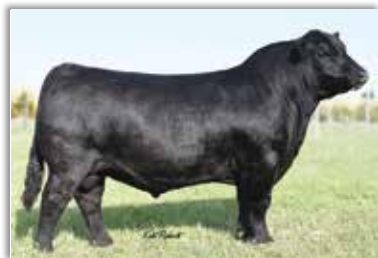
KR Casino 6243 Paternal Grand sire of Lots 42 & 43