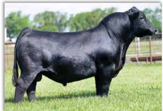
PVF Marvel 9185 Sire of Lot 40

• DUE TO CALVE 2/6/25 TO WEIS LOVER BOY 214L (ASA: 4297143). BULL CALF.