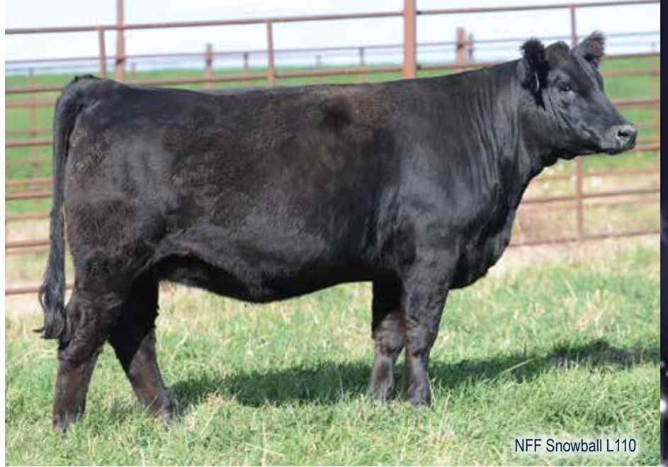
NFF Snowball L110