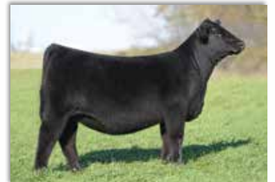
NFF Ellen J132 $37,500 Full Sister to Lot 3