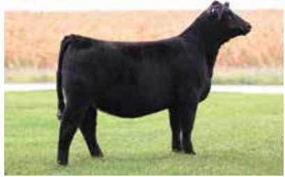
CCS/JS SUMMER 4L $90,000 Full Sister to Lots 1-3