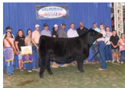
JS DAIRY QUEEN 57G 2021 IA State Fair Grand Champion Purebred Simmental Heifer Dam of Lots 21-27