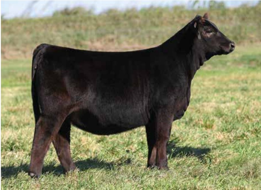
LOT 7 CCS/JS SUMMER 35M