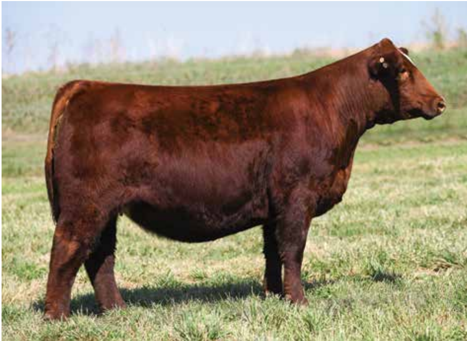
LOT 48 CCS/JS DQ 57G 55L