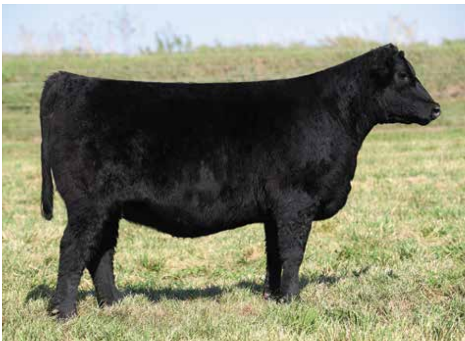
LOT 59 CCS LADY NELLIE 214L