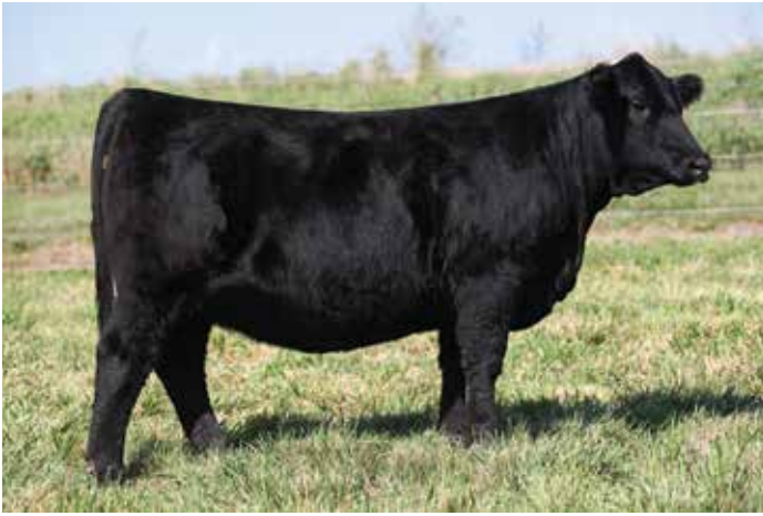
LOT 46 CCS/JS SUMMER 71L