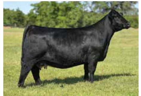
JS BLACK SATIN 9B "BOOTS"

2016 NWSS Grand Champion Purebred Simmental Heifer and 2015 NAILE Grand Champion Purebred Simmental Heifer Full Sister to Lots 32 & 33