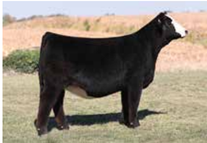
CCS/JS SUMMER 46L $27,000 Full Sister to Lots 13-15