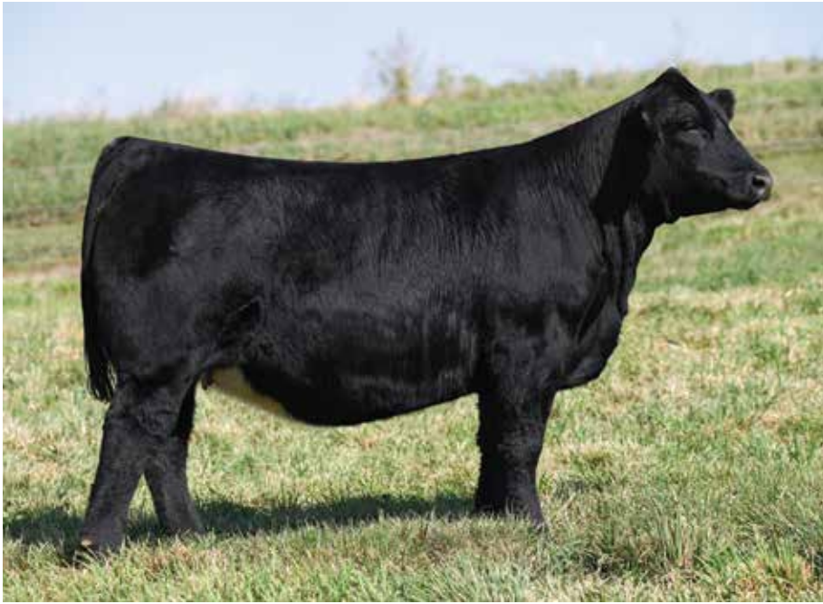
LOT 56 JS FLIRT AWAY 61L