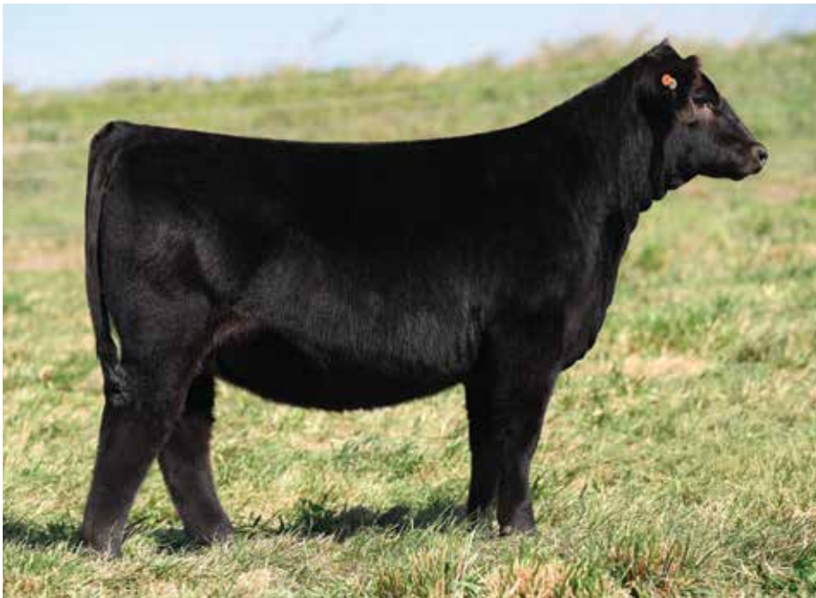
LOT 8 CCS/JS SUMMER 10M