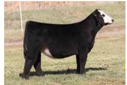
CCS/JS DQ 57G 58L $25,000 Full Sister to Lots 48 & 49