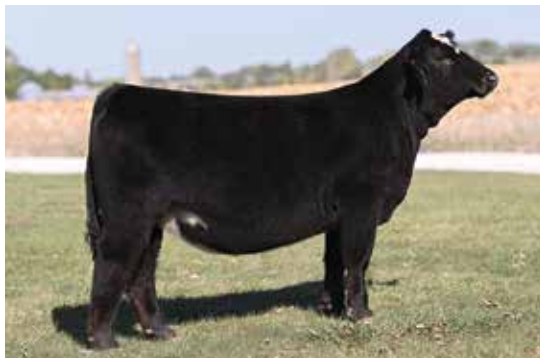
JS DAIRY QUEEN 53L Full Sister to Lots 28 & 29