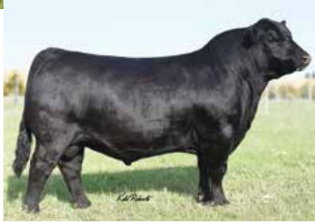
KR CASINO 6243 Sire of Lot 41