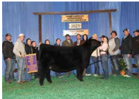
CCS/JS SUMMER 33H 2021 NAILE Grand Champion Purebred Simmental Heifer $32,000 Full Sister to Lots 1-3