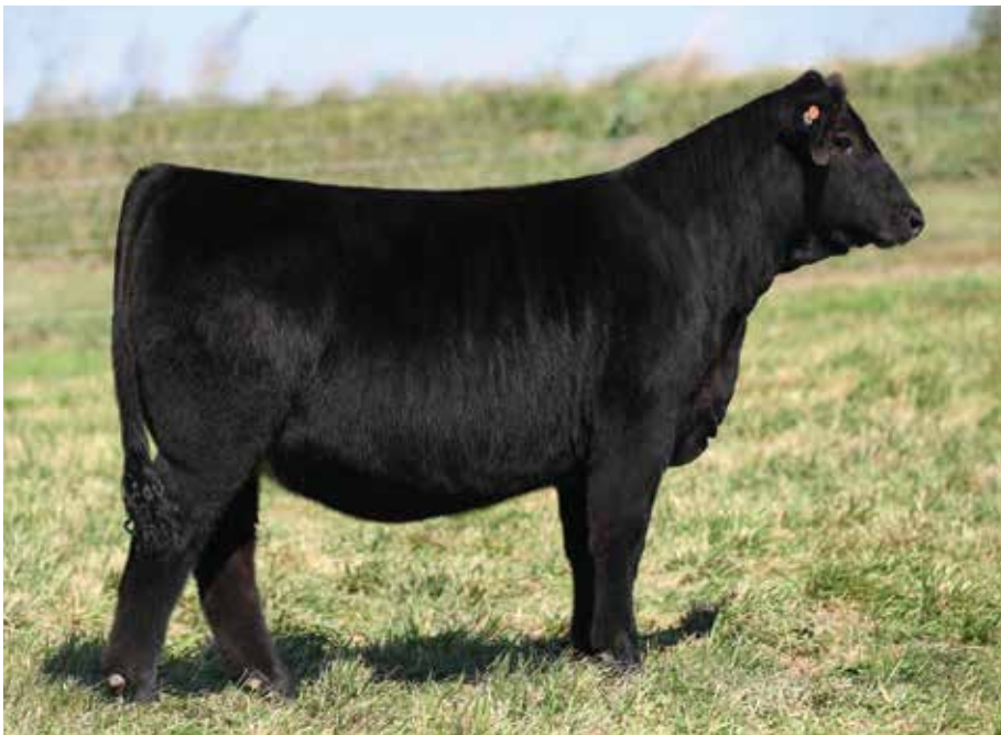
LOT 17 CCS/JS SUMMER 4M