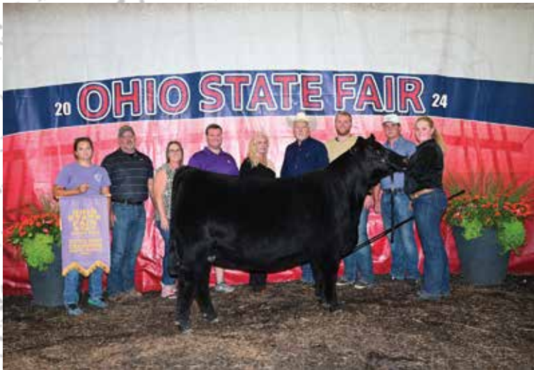
CCS/JS Summer 47L 2024 OH State Fair Reserve Grand Champion Percentage Simmental Heifer