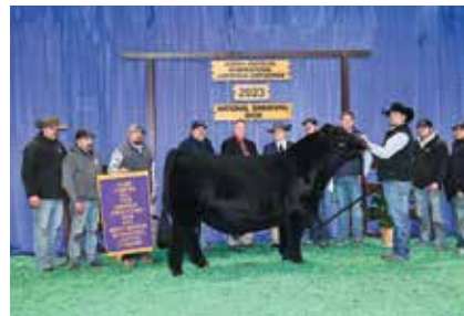
WHF/JS/CCS Woodford J001 2023 NAILE Grand Champion Percentage Simmental Bull