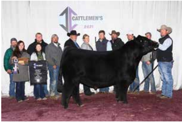
WHF/JS/CCS Double Up G365

2021 Cattlemen's Congress Reserve Grand Champion Purebred Simmental Bull