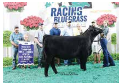
CCS/WHF SUMMER 50F 2019 AJSA National Classic Reserve Grand Champion Bred & Owned Heifer Maternal Sister to Lots 1-18