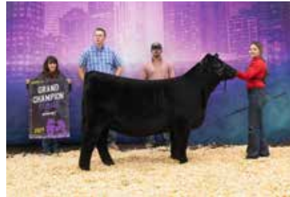
JS Dairy Queen 87L 2024 Harvest Classic Supreme Champion Breeding Heifer