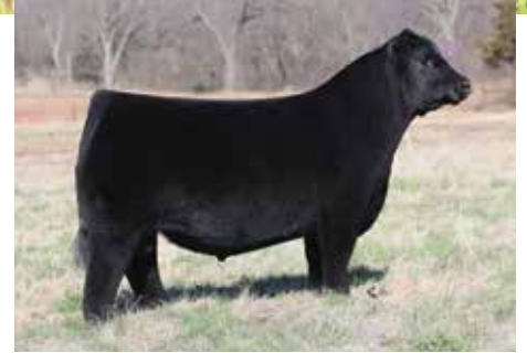
GATEWAY FOLLOW ME F163 Popular AI Sire & Maternal Brother to Lot 41