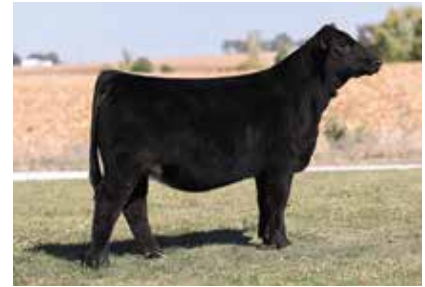
CCS/JS DQ 57G 73L Full Sister to Lot 50