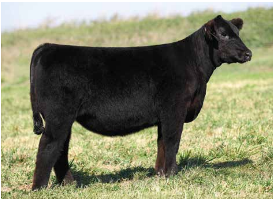
LOT 26 CCS/JS DAIRY QUEEN 57G 42M