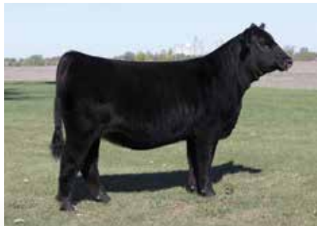
CCS/JS SUMMER 1K $19,000 Full Sister to Lot 46