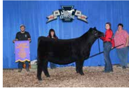
JS Dairy Queen 87L 2024 KILE Reserve Grand Champion Purebred Simmental Heifer