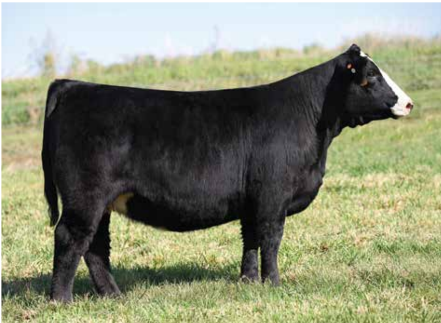
LOT 49 CCS/JS DQ 57G 70L