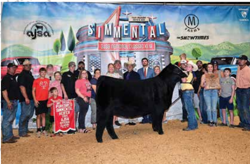
CCS/JS/LFTZ Summer L378 2024 AJSA National Classic 3rd Overall Purebred Simmental Heifer