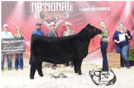
JSUL REBA'S FANCY 8375F 2020 AJSA National Classic Grand Champion Percentage Simmental Heifer Dam of Lot 40