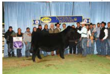
JS Black Satin 9B 2016 NWSS Grand Champion Purebred Female