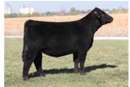
CCS/JS DQ 57G 69L $30,000 Full Sister to Lots 48 & 49