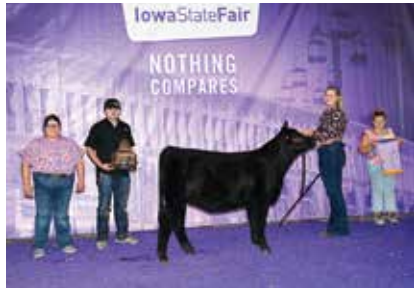
CCS/JS SUMMER 1M 2024 IA State Fair Winter Heifer Calf Division Champion