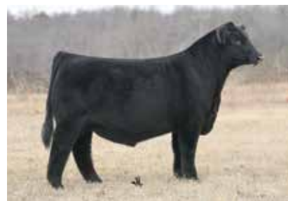
TCF DLP GAMBINO 303 Service Sire to Lots 58 & 59