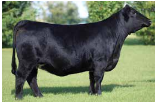
CLRS DAIRY QUEEN 606D $74,000 Dam of Lots 28 & 29