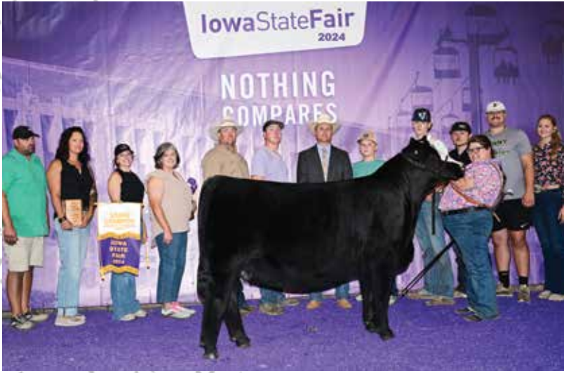
CCS/JS Summer 50L 2024 IA State Fair Grand Champion Percentage Simmental Heifer