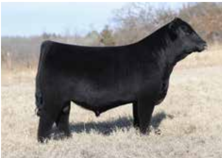
JS KEEPIN IT 90 39H Sire of Lot 46

DUE TO CALVE 1/19/25 TO WHF/JS THE DEUCE K45 (ASA: 4144750).