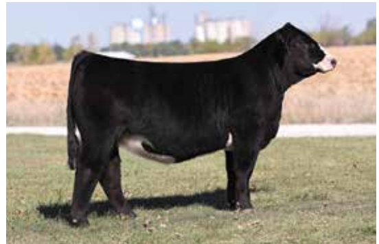
JS DAIRY QUEEN 74L Full Sister to Lots 28 & 29