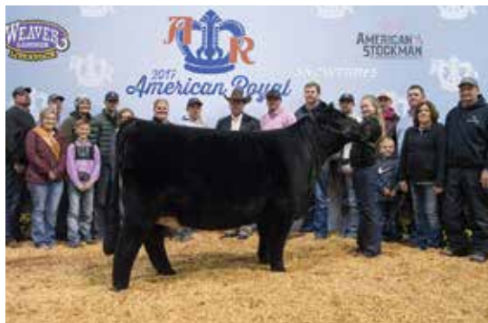
WHF SUMMER 365C

2017 American Royal Supreme Champion Junior Breeding Heifer Dam of Lots 1-18