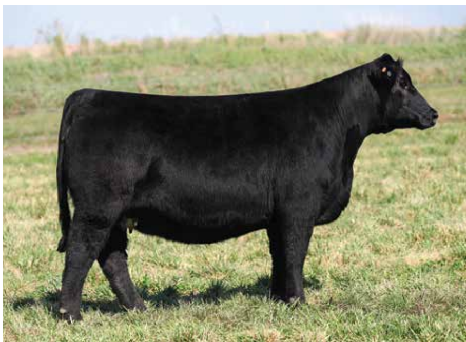
LOT 44 CCS/JS SUMMER 42L