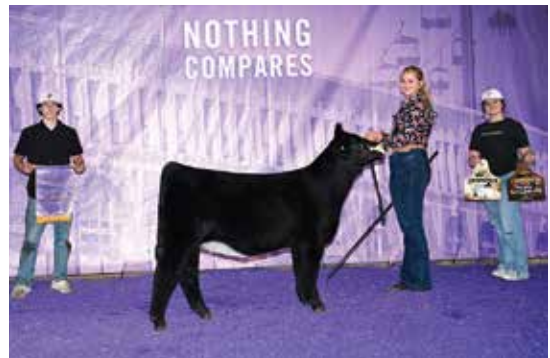
CCS/JS SUMMER 8M 2024 IA State Fair Spring Heifer Calf Division Champion