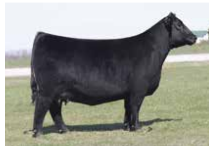
GREIMANS LADY NELLIE 298 Dam of Lots 58 & 59