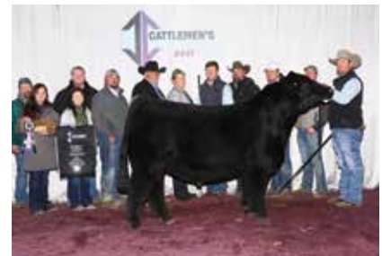
WHF/JS/CCS DOUBLE UP G365 2021 Cattlemen's Congress Reserve Grand Champion Purebred Simmental Bull Maternal Brother to Lots 1-18