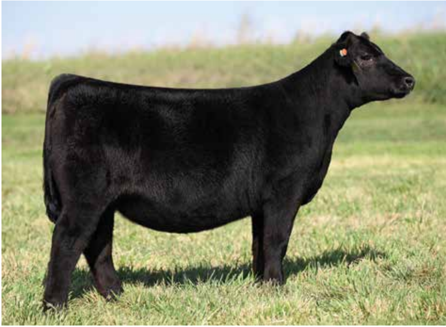
LOT 34 JS FLIRT AWAY 79M