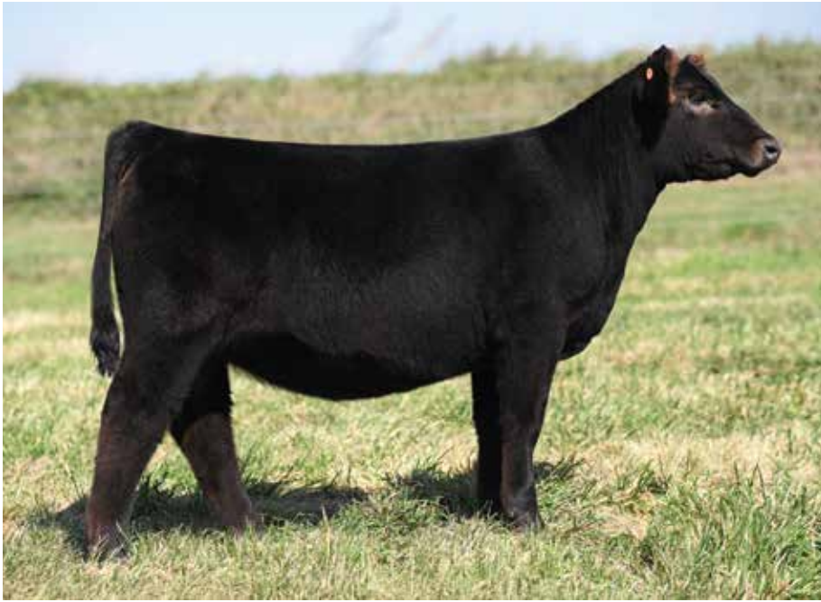
LOT 38 JSUL PROUD MARY 4425M