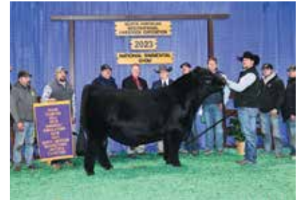
WHF/JS/CCS WOODFORD J001 2023 NAILE Grand Champion Percentage Simmental Bull Sire of Lots 24 & 25