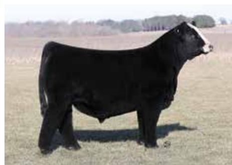
JS DOUBLE OR NOTHING 4K $165,000 Maternal Brother to Lot 19