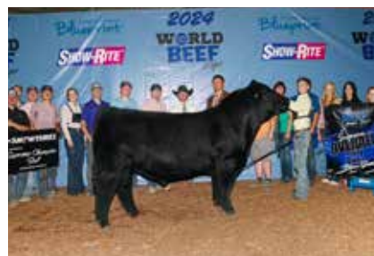
Harkers Medicine Man 2024 World Beef Expo Supreme Champion Bull