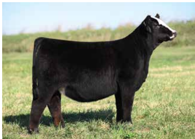
LOT 18 CCS/JS SUMMER 63M