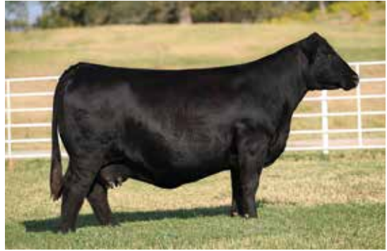
JS FLIRT A-WAY 58E Maternal Sister to Lots 30 & 31