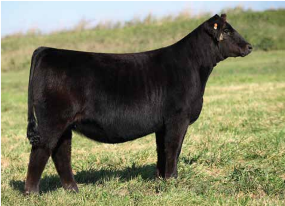
LOT 2 CCS/JS SUMMER 2M