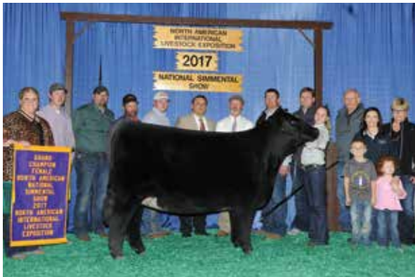
WHF Summer 365C

2017 NAILE Grand Champion Simmental Heifer