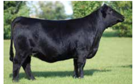
CLRS DAIRY QUEEN 606D $74,000 Dam of Lots 52-55