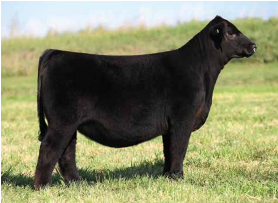
LOT 14 CCS/JS SUMMER 76M