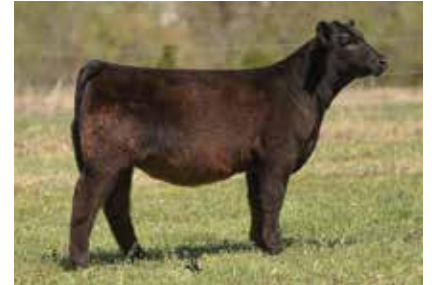
CCS/JS SUMMER 61K $60,000 Maternal Sister to Lots 1-18