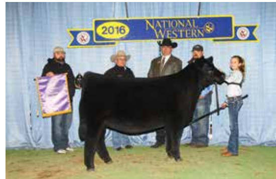
DAF REBA C85 2016 NWSS Grand Champion Percentage Simmental Heifer Maternal Granddam of Lot 40