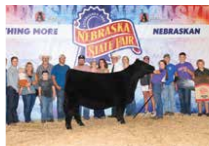
JS PEARL 52K 2023 NE State Fair Supreme Champion 4-H Breeding Heifer Maternal Sister to Lots 36 & 37