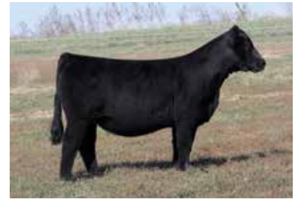
JS FLIRT AWAY 20K $33,000 Maternal Sister to Lots 30 - 35