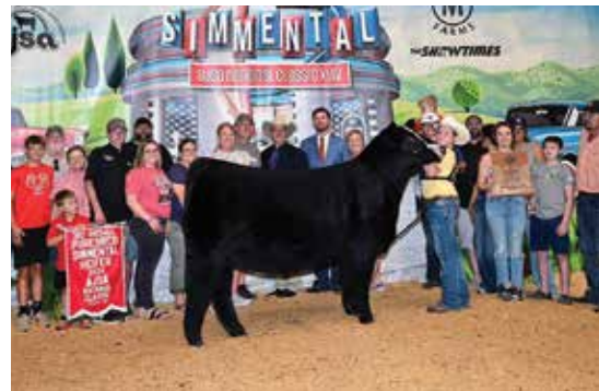
CCS/JS/LFTZ SUMMER L378 2024 AJSA National Classic 3rd Overall Purebred Simmental Heifer 3/4 Sister in Blood to Lots 4-9