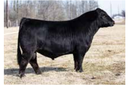
WHF POINT PROVEN H45 Sire of Lot 16