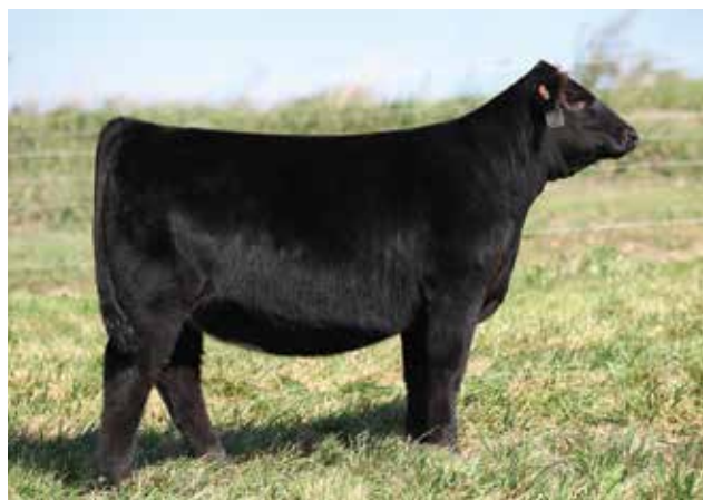
LOT 20 JS MISS ANNE 11M