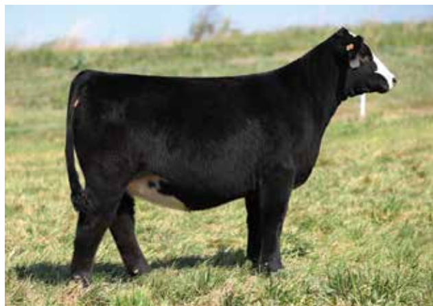
LOT 19 CCS/JS GUCCI 13M