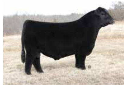
HARKERS UNLEASHED Sire of Lot 26