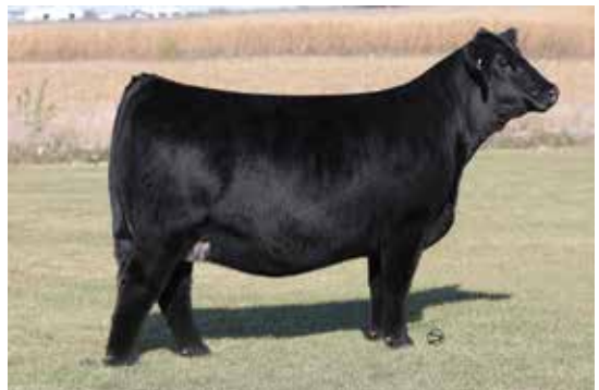
JS DAIRY QUEEN 57G Dam of Lots 21-27