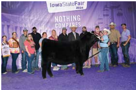
CCS/JS/LFTZ SUMMER L378 2024 IA State Fair Reserve Grand Champion Purebred Simmental Heifer 3/4 Sister in Blood to Lots 4-9