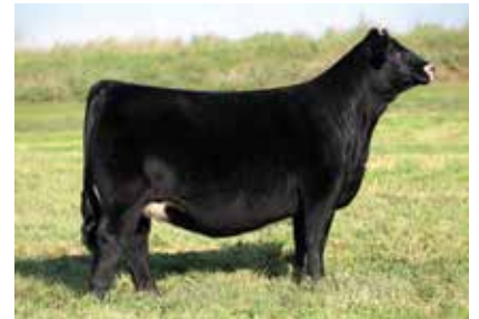
CCS/JS SUMMER 39L $21,000 Full Sister to Lot 17