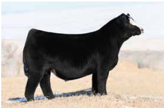
NEXT LEVEL Sire of Lots 21-23