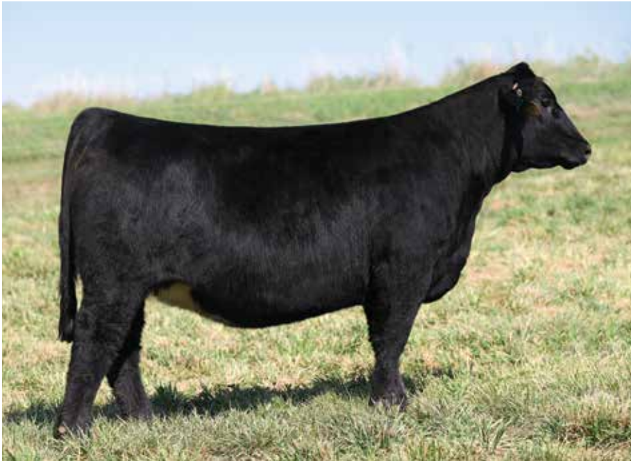
LOT 52 JS DAIRY QUEEN 80L