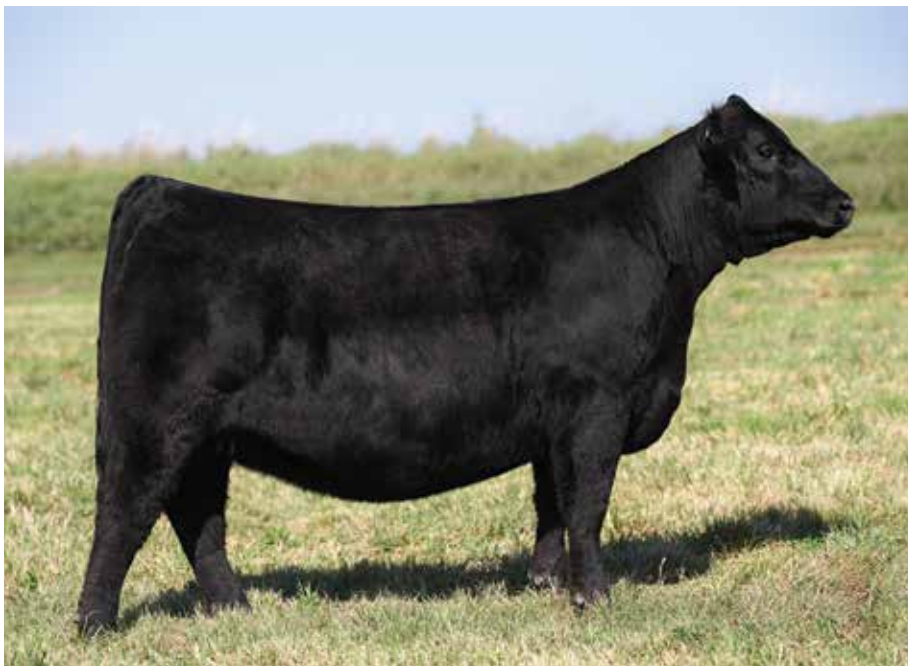
LOT 51 CCS/JS DQ 57G 3L