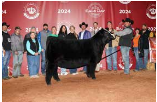
CCS/JS/LFTZ SUMMER L378 2024 American Royal Grand Champion Purebred Simmental Heifer Full Sister to Lot 45