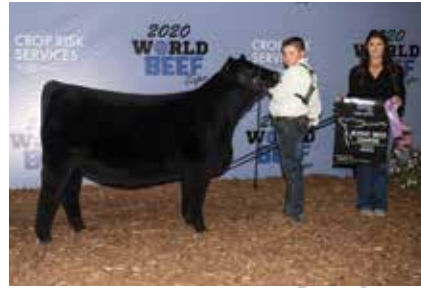
JS Dairy Queen 56G 2020 World Beef Expo Reserve Grand Champion Heifer