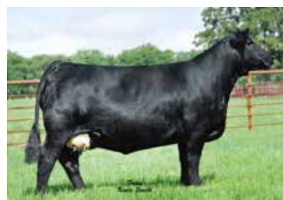
RP/MP BUILT TO LOVE A021 Paternal Granddam of Lot 27