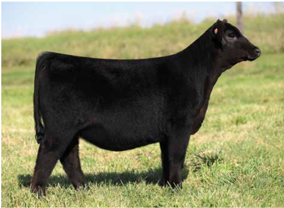
LOT 15 CCS/JS SUMMER 84M