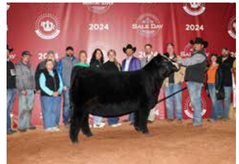
CCS/JS/LFTZ SUMMER L378 2024 American Royal Grand Champion Purebred Simmental Heifer $40,000 Full Sister to Lots 1-3