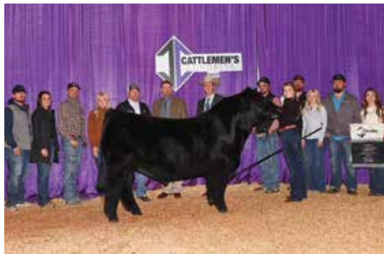
R/C SFI CREEDENCE 417J 2023 Cattlemen's Congress Grand Champion Purebred Simmental Bull Sire of Lots 10-12