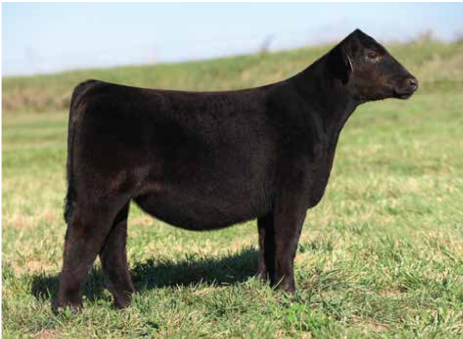
LOT 35 JS FLIRT AWAY 73M