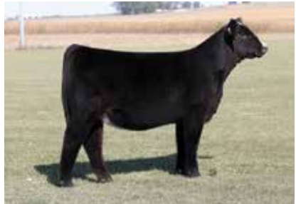
CCS/JS SUMMER 39J $44,000 Full Sister to Lots 1-3