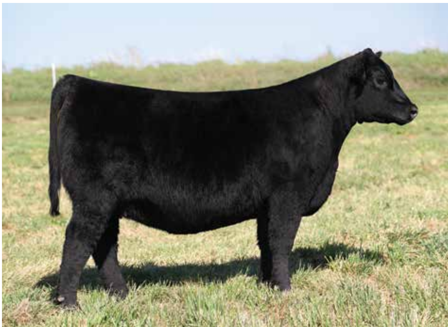
LOT 58 CCS LADY NELLIE 207L