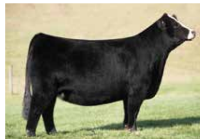
JS PEARL 37E Dam of Lots 36 & 37