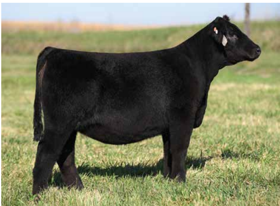
LOT 27 CCS/JS DAIRY QUEEN 57G 66M