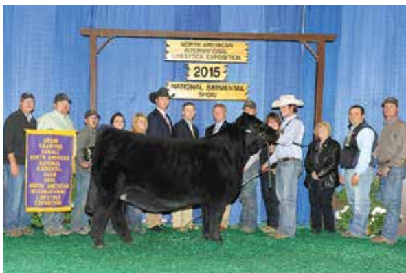
JS Black Satin 9B

2015 NAILE Grand Champion Purebred Female