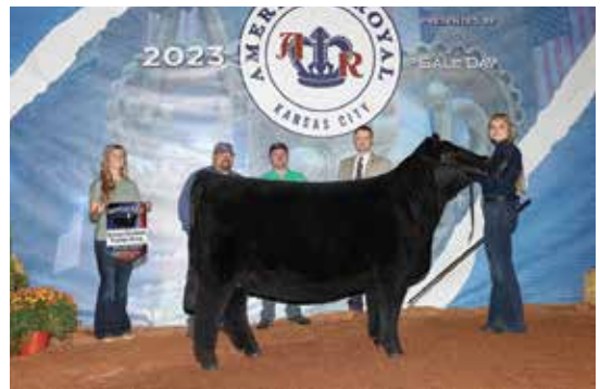
WHF SUMMER 005J

2017 American Royal Supreme Champion Junior Breeding Heifer Dam of Lots 1-18