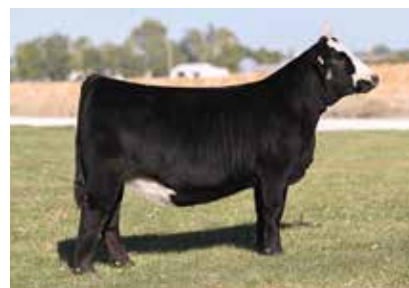
CCS/JS DQ 57G 59L $10,000 Full Sister to Lots 21-23