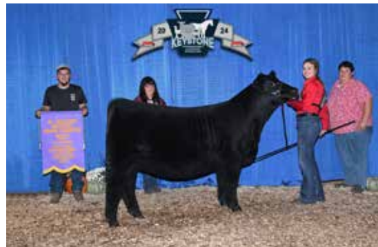
JS DAIRY QUEEN 87L 2024 KILE Reserve Grand Champion Purebred Simmental Heifer Maternal Sister to Lots 28 & 29