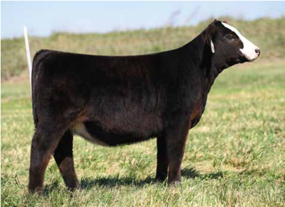
LOT 11 CCS/JS SUMMER 18M