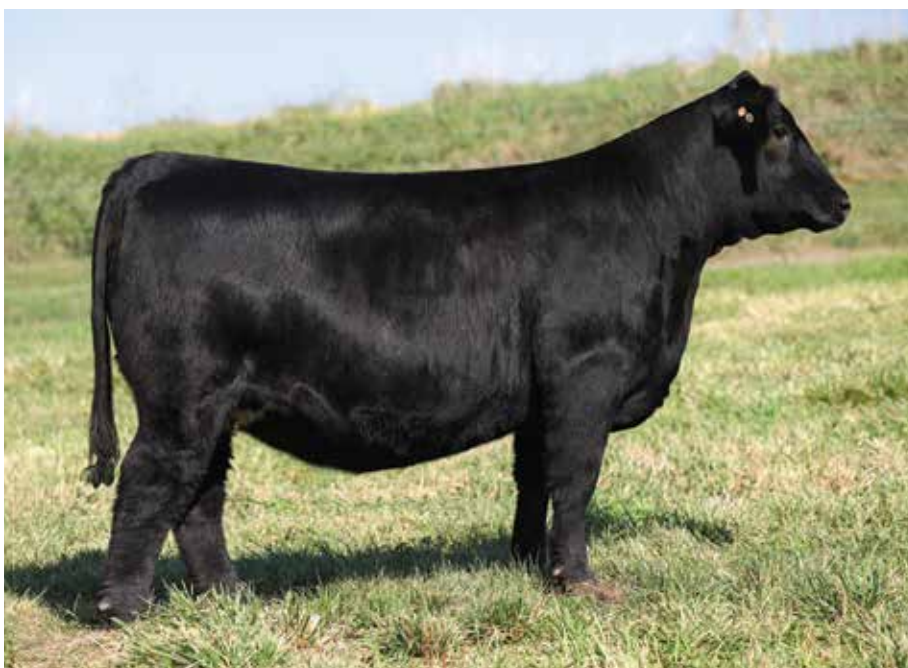
LOT 55 JS DAIRY QUEEN 52L