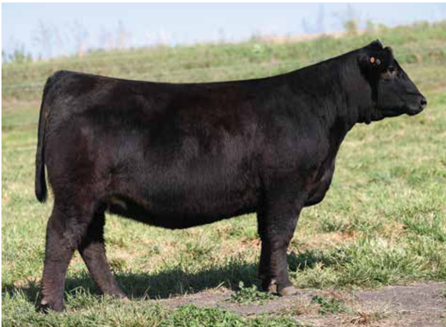
LOT 53 JS DAIRY QUEEN 79L