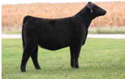
CCS/JS SUMMER 49L $30,000 Full Sister to Lots 13-15