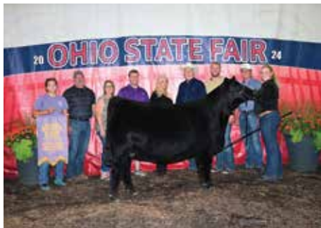
CCS/JS SUMMER 47L 2024 OH State Fair Reserve Grand Champion Percentage Simmental Heifer $70,000 Full Sister to Lots 13-15