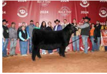
CCS/JS/LFTZ Summer L378 2024 American Royal Grand Champion Purebred Simmental Heifer