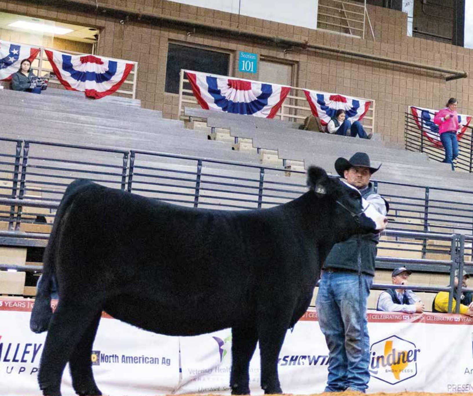
2024 American Royal Grand Champion Percentage Simmental Heifer Sired by Harkers Unleashed