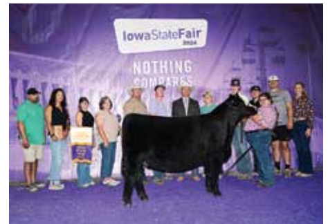
CCS/JS SUMMER 50L 2024 IA State Fair Grand Champion Percentage Simmental Heifer $40,000 Full Sister to Lots 13-15