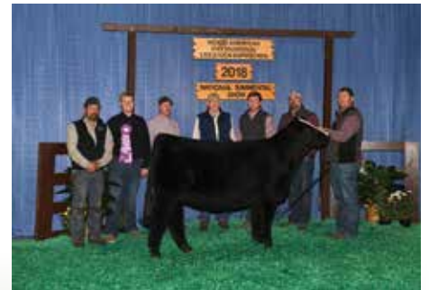
WHF AUTUMN 365E Dam of Lot 47