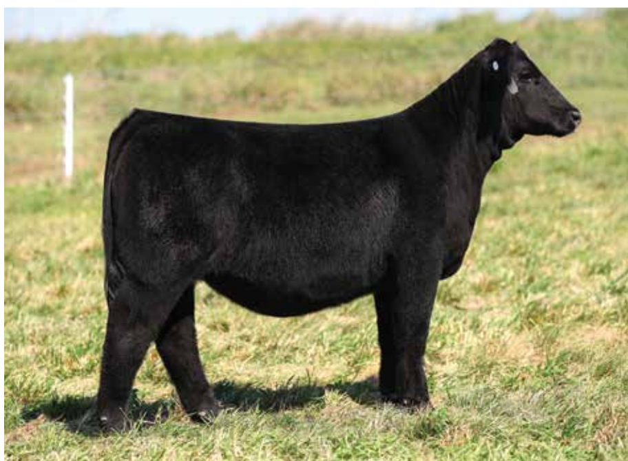
LOT 37 PEARL 7M