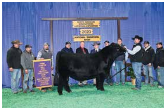
WHF/JS/CCS WOODFORD J001 2023 NAILE Grand Champion Percentage Simmental Bull Sire of Lots 30 & 31