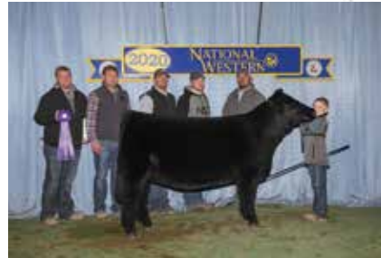
WHF Andie 369F 2020 NWSS Division Champion

2018 NAILE Grand Champion Angus Female Jr. Show