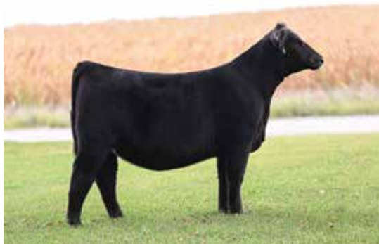
CCS/JS SUMMER 47L $70,000 Full Sister to Lots 42-44