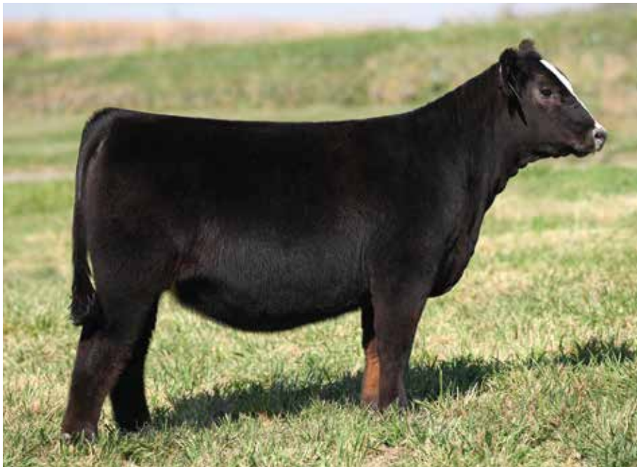
LOT 5 CCS/JS SUMMER 36M