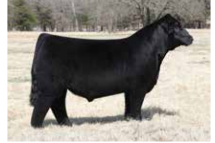
R/C SFI CREEDENCE 417J Sire of Lots 34-37