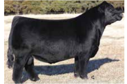
JSUL SOMETHING ABOUT MARY 8421 Full Brother to Lot 38