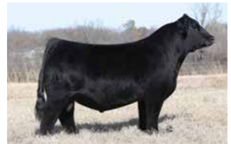
WHF/JS/CCS DOUBLE UP G365 Sire of Lots 56 & 57