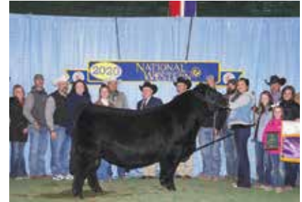
RECKONING 711F 2020 NWSS Grand Champion Percentage Simmental Bull Sire of Lots 4-9