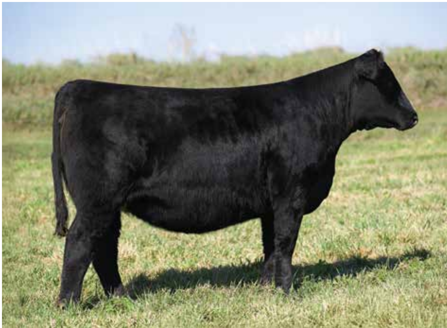
LOT 50 CCS/JS DQ 57G 67L