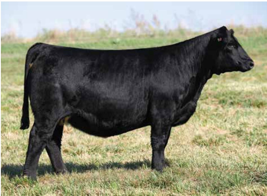
LOT 57 JS FLIRT AWAY 66L