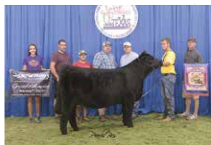
JS Black Satin 9B 2015 AJSA Summer Classic Grand Champion Purebred Female

2015 NAILE Grand Champion Purebred Female