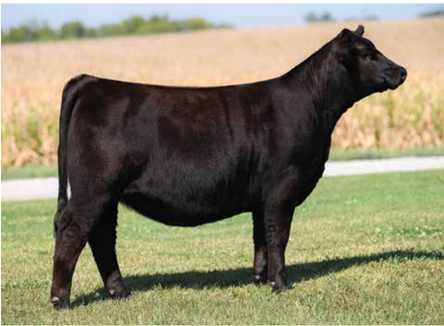
LOT 3 CCS/JS SUMMER 1M