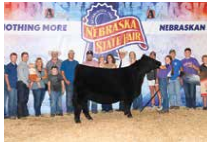
JS Pearl 52K 2023 NE State Fair Supreme Champion 4-H Breeding Heifer