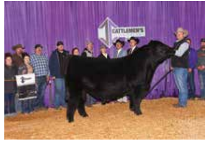
Harkers Unleashed 2022 Cattlemen's Congress Grand Champion Percentage Simmental Bull

2021 Cattlemen's Congress Reserve Grand Champion Purebred Simmental Bull