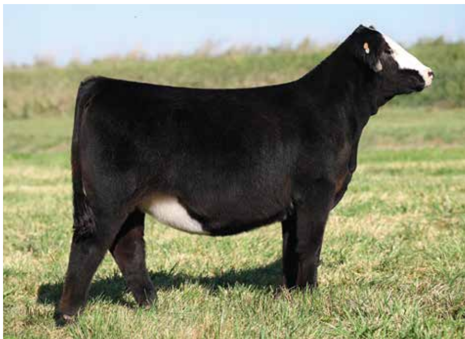
LOT 22 CCS/JS DAIRY QUEEN 57G 65M