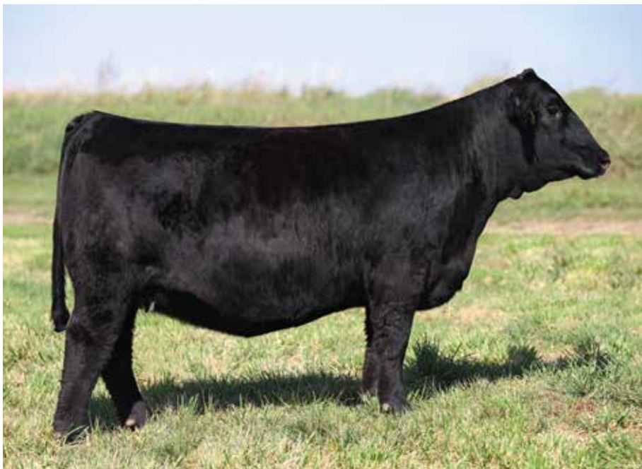
LOT 54 JS/HOTZ DAIRY QUEEN 33L