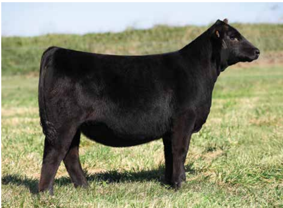
LOT 6 CCS/JS SUMMER 33M