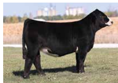
JS DAIRY QUEEN 74L Full Sister to Lot 55