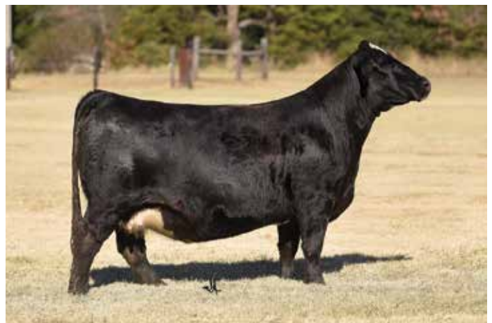
BOSS LAKE FLIRT A WAY 740E $76,000 Full Sister to Lots 32 & 33