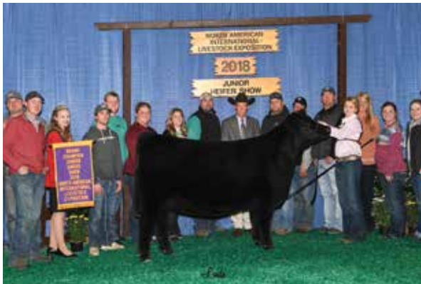
UDE Ellie 153E

2018 NAILE Grand Champion Angus Female Jr. Show