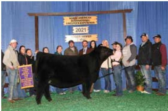
CCS/JS SUMMER 33H 2021 NAILE Grand Champion Purebred Simmental Heifer Full Sister to Lot 45