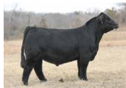
WHF/JS THE DEUCE K45

Service sire to several females throughout the offering!