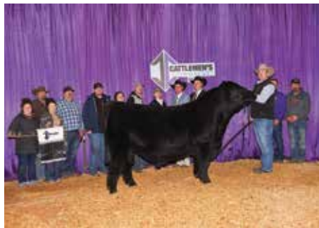
HARKERS UNLEASHED 2022 & 2023 Cattlemen's Congress Grand Champion Percentage Simmental Bull Sire of Lots 13-15