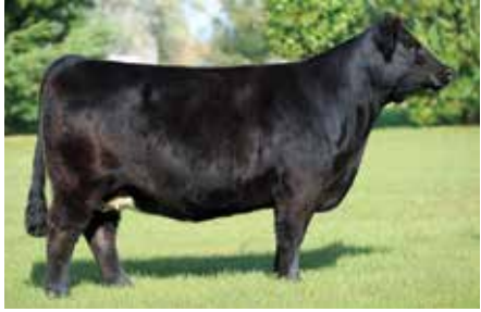
WHF SUMMER 365C Dam of Lots 1-18