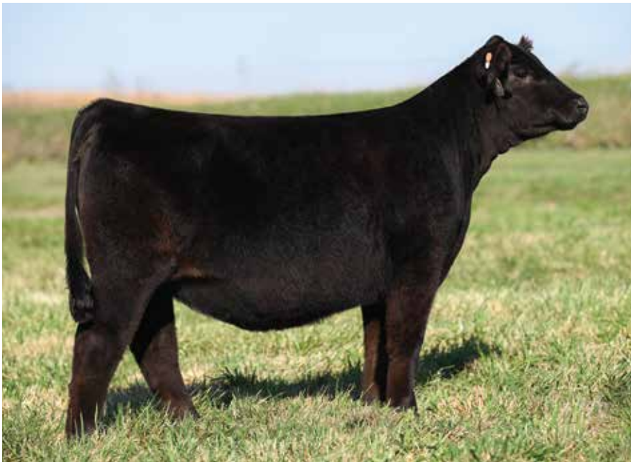
LOT 25 CCS/JS DAIRY QUEEN 57G 67M