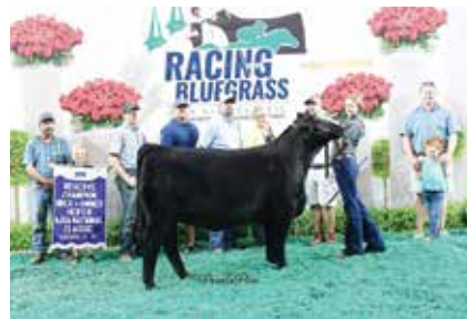
CCS WHF Summer 50F 2019 AJSA National Classic Reserve Champion Bred & Owned Heifer

2017 NAILE Grand Champion Simmental Heifer