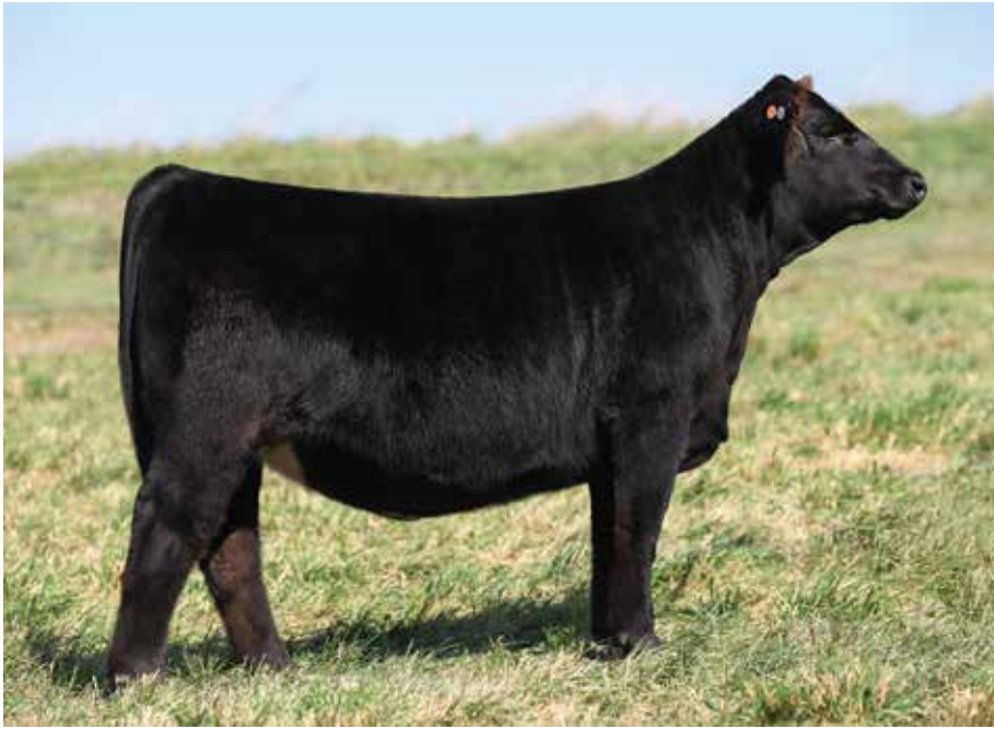
LOT 16 CCS/JS SUMMER 25M