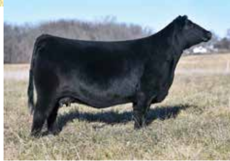
DUNK-W MAXINE 505C Dam of Lot 41