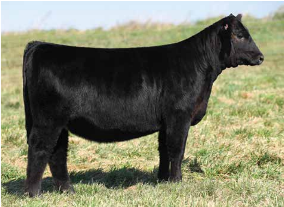
LOT 12 CCS/JS SUMMER 9M