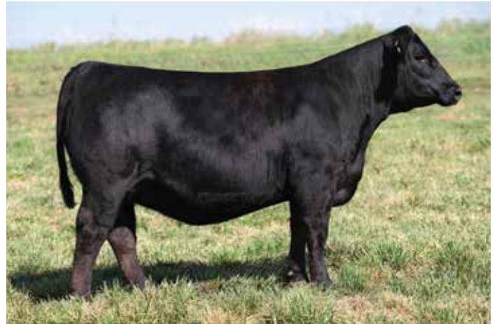
LOT 47 CCS/JS AUTUMN 7L

DUE TO CALVE 1/20/25 TO WHF/JS THE DEUCE K45 (ASA: 4144750).