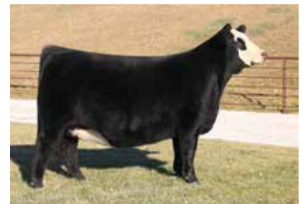
JBSF PROUD MARY Dam of Lots 38 & 39