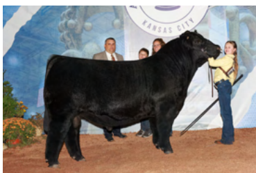
DUNK FRANCISCO 201K ET 2023 AMERICAN ROYAL GRAND CHAMPION MAINTAINER BULL FULL BROTHER TO LOT 20