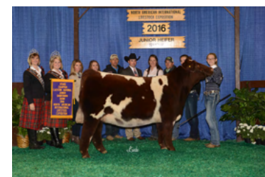
SULL DREAM ON 5158 ET 2016 NAILE GRAND CHAMPION SHORTHORN HEIFER MATERNAL GRANDDAM OF LOT 9