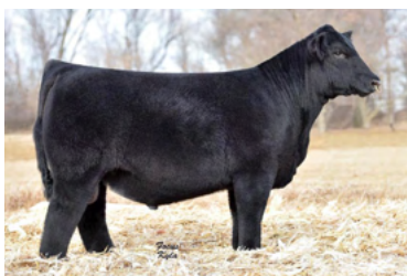
BBR MEMPHIS MAFIA 3E ET FULL BROTHER TO MATERNAL GRANDDAM OF LOT 14