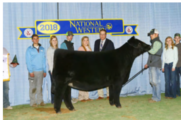
PEINE/GS ROSIE 677D 2018 NWSS RESERVE GRAND CHAMPION PUREBRED SIMMENTAL HEIFER DAM OF LOT 30

BREED PB SIMMENTAL · ASA 4436646 · DOB 4/16/24 · OFFERED BY FITZ GENETICS