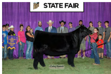
BCII SHELBY 02K

BREED PB SIMMENTAL · ASA 4436108 · DOB 5/10/24 · OFFERED BY FITZ GENETICS