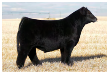
MINN CLASS ON CLASS 77E ET SIRE OF LOT 18

BREED MAINTAINER/2.47% CHIANINA • AMAA 556944 • DOB 4/12/24 • OFFERED BY FITZ GENETICS