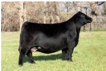
PLUM CREEK ANNIE LU 9271 DAM OF LOTS 1 & 2

BREED ANGUS • AAA 21082298 • DOB 4/10/24 • OFFERED BY WEIS CATTLE