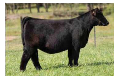
LASHMETT/WEIS VICKI M416