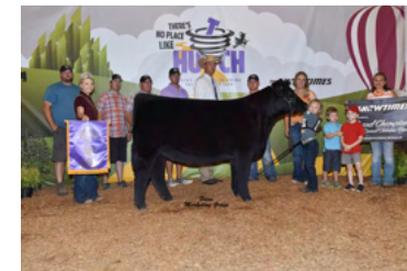
HDLY PRINCESS 607D 2017 NATIONAL JUNIOR HEIFER SHOW GRAND CHAMPION BRED & OWNED CHIANINA HEIFER MATERNAL SISTER TO DAM OF LOT 19

This daughter of GOET Drivin 80 is one that you have to admire because of the stoutness of feature, rugged design, and square build that she has at the surface, these factors have laid the foundation for her immense skeletal quality. Additionally we have always admired the extra dimension from both a width and depth standpoint that this female possesses. DUNK FTZS Molly 493M is one that catches a gear every day, and as we approach sale time she will find the attention she deserves because her upside potential is significant! She does all the intangibles so right, and is the kind that make you stare when she poses, yet makes you fall in love when she sets in motion. Her pedigree links her to HDLY Princess 607D, the 2017 National Junior Heifer Show Grand Champion Bred & Owned Chianina Heifer and the Reserve Grand Champion Maintainer Female for the Dunklau family. She will be ready to collect banners whenever you are!