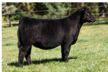
KCKR WEIS TAMARA 488M $24,500 MATERNAL SISTER TO LOTS 23 & 24