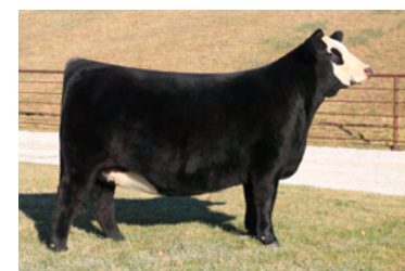
JBSF PROUD MARY