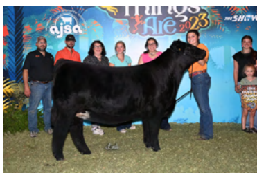
TCB STELLA 33K 2023 AJSA NATIONAL CLASSIC 13TH OVERALL PUREBRED SIMMENTAL HEIFER FULL SISTER TO LOT 28