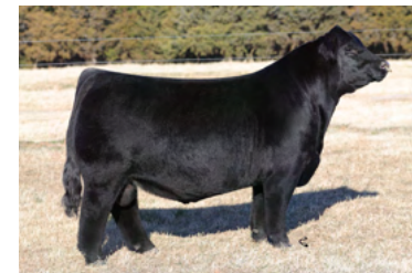
JSUL SOMETHING ABOUT MARY 842I