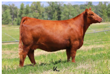
SLGN STONY'S BECCA 4215 DAM OF LOT 6

BREED RED ANGUS • RAAA 4995295 • DOB 3/4/24 • OFFERED BY WEIS CATTLE