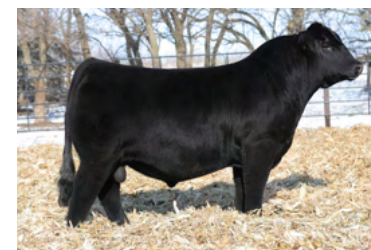
SO REMEDY 7F