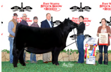
STELLA 08E "TINK" 2019 FWSS RESERVE GRAND CHAMPION PUREBRED SIMMENTAL HEIFER DAM OF LOT 28