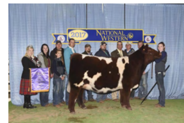
SULL DREAM ON 5158 ET 2017 NWSS GRAND CHAMPION SHORTHORN HEIFER MATERNAL GRANDDAM OF LOT 9

A purebred Shorthorn female that comes with all the bells and whistles, as she is built incredibly robust and dimensional in the shape of her forerib and center body, her neck comes super high out of the top of her shoulder, and she floats when set into motion. She comes by this quality honestly though, as her maternal granddam, SULL Dream On 5158 ET was a two-time National Western Stock Show Grand Champion, and has reserved her place in the history books as one of the most dominant Shorthorn show heifers of all time! She then went on to become a matron of the Shorthorn breed, exceeding the $1 million mark in production, and generating Shorthorn and Shorthorn Plus cattle that are of elite status. Full brothers to the dam of Lot 9 include the breed leading AI sires SULL Dream Maker 914IG and SULL Accountability I319J, and the National Champion Shorthorn Plus Bull, TSSC BT Limit Up I099J ET. Pedigree alone, this female is valuable property!