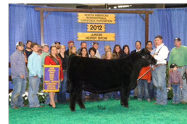
GAMBLES DOUBLE L SHADOE 312I 2012 NAILE GRAND CHAMPION JUNIOR ANGUS HEIFER MATERNAL GRANDDAM OF LOT 5

CLF Weis Shadoe 58M 3015 is a stout made, bold bodied May born show heifer/donor prospect that is very intriguing in her design, she comes high in her neck attachment, bold in her muscle shape, and offers an abundance of foot and bone. She is certainly one that paints an incredible silhouette, and then has the burliness to impress from every angle. Her maternal granddam, Gambles Double L Shadoe 312I was the Grand Champion Junior Angus Heifer at the North American, and back a further generation reveals the Gambles Shadoe 9047 female that was a pivotal piece in the Gamble programs arsenal of futuristic Angus stock. Here is the next unique female from the legendary Shadoe cow family!