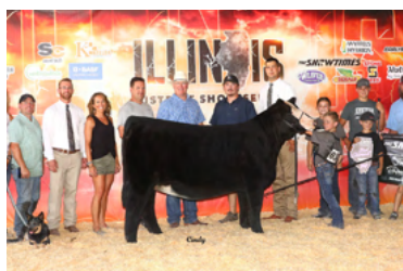
JS TAMARA 88H DAM OF LOTS 23 & 24