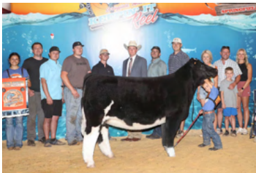
WEIS LEXI 888L 2024 NATIONAL JUNIOR HEIFER SHOW 5TH OVERALL CHI COMPOSITE HEIFER $46,500 FULL SISTER TO LOT 17