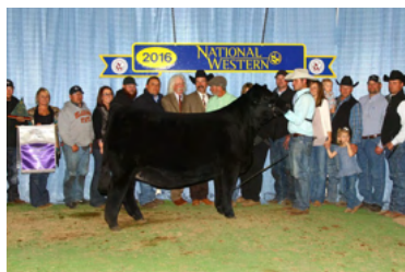
JS BLACK SATIN 9B "BOOTS" 2015-2016 TRIPLE CROWN WINNING PUREBRED SIMMENTAL HEIFER FULL SISTER TO DAM OF LOTS 23 & 24

BREED PB SIMMENTAL • ASA 4410691 • DOB 5/5/24 • OFFERED BY WEIS CATTLE