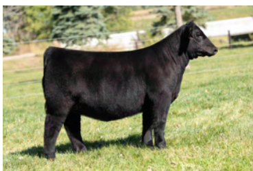
KRUSE ANNIE LU 44M $109,500 FULL SISTER TO LOT 1 & MATERNAL SISTER TO LOT 2