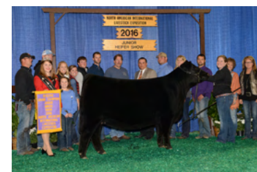
KDJ QUEEN RUTH 502 LEGENDARY MATERNAL GRANDDAM OF LOT 3