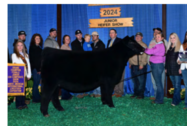
DUNK LYDIA 382L 2024 NAILE GRAND CHAMPION CHI COMPOSITE HEIFER FULL SISTER TO LOT 21