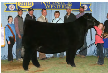
WLFF MISS FRAN 37E 2019 NWSS RESERVE GRAND CHAMPION MAINTAINER HEIFER DAM OF LOT 20