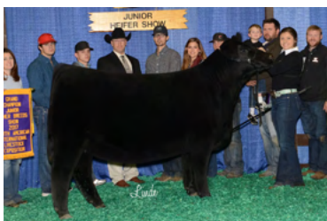
DUNK MW LUCY MB 610D 2017 NAILE GRAND CHAMPION JUNIOR AOB HEIFER FULL SISTER TO 3RD GENERATION MATERNAL GRANDDAM OF LOT 16