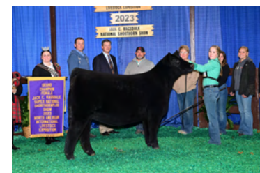
S/T CULL DREAM ON ME 300 2023 NAILE GRAND CHAMPION SHORTHORN PLUS HEIFER MATERNAL SISTER TO DAM OF LOT 9