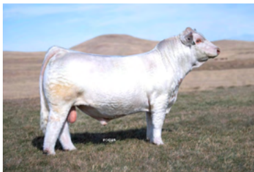
TC OUTER BANKS 0IJ FULL BROTHER TO LOT 8

BREED CHAROLAIS • AICA EFI358400 • DOB 5/6/24 • OFFERED BY WEIS CATTLE