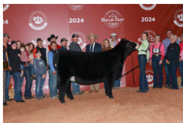
JSUL ROSIE 3418L 2024 AMERICAN ROYAL SUPREME CHAMPION JUNIOR BREEDING HEIFER MATERNAL SISTER TO LOT 30