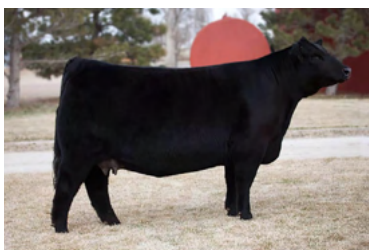
GEF MISS DOMINATRIX 236A 3RD GENERATION MATERNAL GRANDDAM OF LOT 14