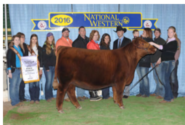
SLGN STONY'S BECCA 4215 2016 NWSS RESERVE GRAND CHAMPION RED ANGUS HEIFER DAM OF LOT 6