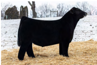
BBR MADE MAN 15K FULL BROTHER TO DAM OF LOT 14

BREED MAINE ANJOU • AMAA 556817 • DOB 5/13/24 • OFFERED BY FITZ GENETICS