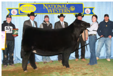
STELLA 08E "TINK" 2019 NWSS RESERVE GRAND CHAMPION PUREBRED SIMMENTAL HEIFER DAM OF LOT 28

BREED PB SIMMENTAL · ASA 4411518 · DOB 5/12/24 · OFFERED BY WEIS CATTLE