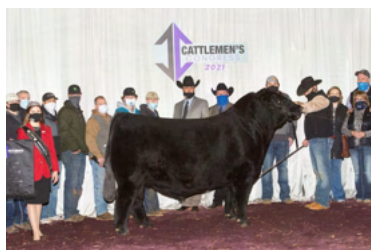
BNWZ DIGNITY 8017

2019 NJAS 4TH OVERALL OWNED HEIFER MATERNAL GRANDDAM OF LOT 4