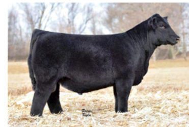
BBR MEMPHIS MAFIA 3E ET SIRE OF LOT 21