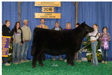
BMW MS ACE 422C

BREED 1/2 SIMMENTAL/4.43% CHIANINA • ASA PENDING | ACA PENDING • DOB 4/8/24 • OFFERED BY FITZ GENETICS