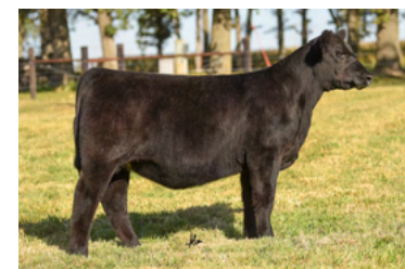
LASHMETT/WEIS QUEEN RUTH K222 $100,000 MATERNAL SISTER TO LOT 3