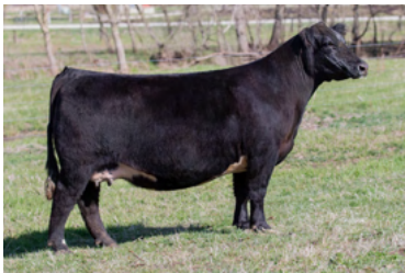
KANE WEIS LEXI 888H DAM OF LOT 17

Look, presence, style, quality, elegance...you name it, Weis Lexi 888M has it! While her obvious chrome color pattern may catch your attention, it is the fundamentals of pin width, muscle shape, turn to her ribcage, high tying neck attachment and striking poise that really elevates our opinion of this show heifer/donor prospect. She comes extra rugged in her bone work, and hits the surface with a big foot, flexible ankle and fluid hock joint. The cow family in support of this All Me 10F daughter represents a major cornerstone in the Weis Cattle program, stemming back to the Diamond female who has been a potent source of genetic matriarchy through several daughters that continue to lead the donor pen. Her direct dam, Kane Weis Lexi 888H is certainly one of the most recognizable members of the donor pen, and is becoming one of the most potent producers of quality, being the dam of Hudson Cromwell's 5th Overall Chi Composite Heifer at the 2024 National Junior Chianina Heifer Show this past summer, and furthermore a full sister to Lot 17. Power in the blood is an understatement in this scenario.