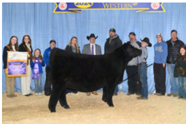
DUNK FTZS FRANNY 227K ET 2024 NWSS GRAND CHAMPION MAINTAINER HEIFER $38,000 FULL SISTER TO LOT 20

BREED MAINTAINER/1.65% CHIANINA · AMAA 556629 | ACA 424921 · DOB 5/3/24 · OFFERED BY FITZ GENETICS