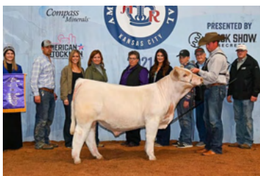
TC OUTER BANKS 0IJ 2021 AMERICAN ROYAL ROE GRAND CHAMPION CHAROLAIS BULL FULL BROTHER TO LOT 8