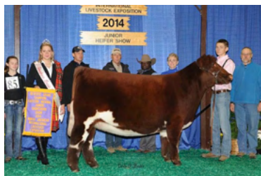
SULL BLOODED RUBY 3278 ET

BREED SHORTHORN PLUS • ASA AR4384022 • DOB 4/3/24 • OFFERED BY FITZ GENETICS