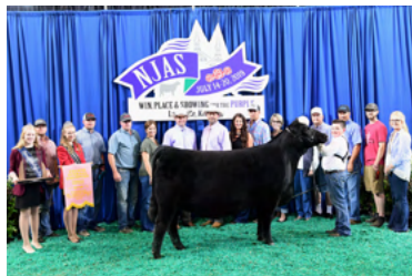
FCF PHYLLIS 770

BREED ANGUS • AAA 21075269 • DOB 4/25/24 • OFFERED BY WEIS CATTLE