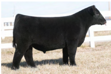
WE NEED MORE SIRE OF LOT 16

BREED MAINTEINER/7.2% CHIANINA · ACA 425021 · DOB 5/3/24 · OFFERED BY FITZ GENETICS