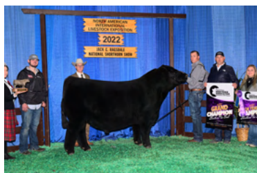
TSSC BT LIMIT UP 1099J ET

2014 NAILE RESERVE GRAND CHAMPION SHORTHORN HEIFER MATERNAL GRANDDAM OF LOT 10