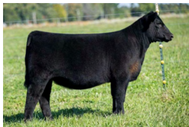
BMW ACE 307K

2016 NAILE GRAND CHAMPION JUNIOR CHIANINA HEIFER MATERNAL GRANDDAM OF LOT 22