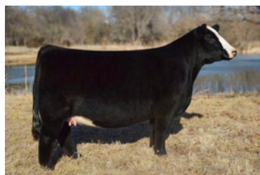
BPFC SHELBY 542Z

2023 INDIANA STATE FAIR 4TH OVERALL 4-H BREEDING HEIFER MATERNAL SISTER TO LOT 26