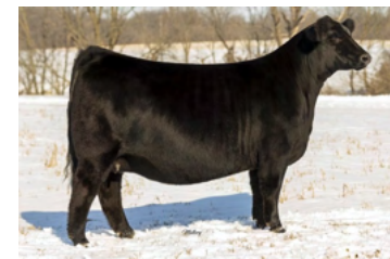
KC2 MISS VICTORIA 6H

M401 is another top shelf Purebred Simmental heifer that is sired by the $530,000 SO Remedy 7F and further influenced by the young and very proven donor dam, KC2 Miss Victoria 6H! We love the rugged build and extra stoutness that she possesses. There is no denying that daughters of SO Remedy 7F have the credentials and track record to go the distance and win at the highest level. 6H was a many-time champion for the Lashmett family that landed a spot in the top 10 at the AJSA National Classic in 2021. Her most notable sister, Lashmett/Weis Vicki M416, commanded an impressive $105,000 price tag in the Weis Cattle Online Female Sale in October. Other sisters of M401 have sold for $33,000, $14,500, and $14,000. We love the genuineness of her rib cage, stoutness of hip and pin set, and overall balance that this elite show heifer/donor prospect brings to the equation! WEIS CATTLE IS RETAINING 50% EMBRYO INTEREST.