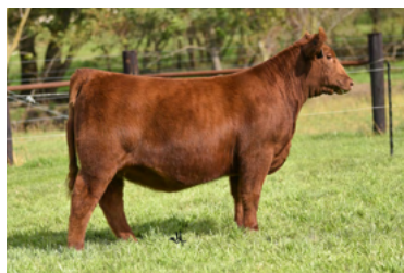
EEG BECCA 17L $70,000 MATERNAL SISTER TO LOT 6