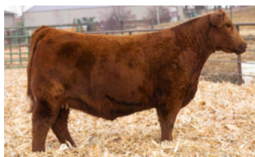
BUE MISS ROSA DAM OF LOT 18