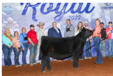
JSUL TSSC LADY IN BLACK 2181K 2022 AMERICAN ROYAL GRAND CHAMPION PUREBRED SIMMENTAL HEIFER MATERNAL SISTER TO LOT 30