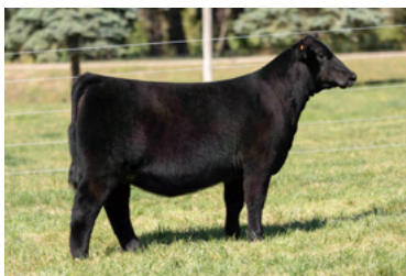
KRUSE ANNIE LU 29M $42,000 FULL SISTER TO LOT 2