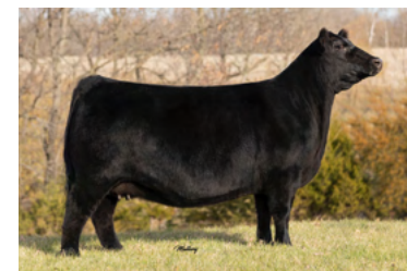
UDE QUEEN RUTH 9088 "BECKY" DAM OF LOT 3