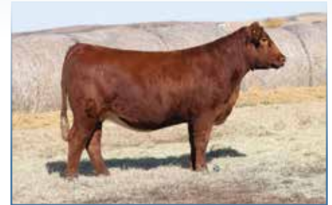
MF DONNA 3425 234 Maternal Sister to Lots 37 & 38