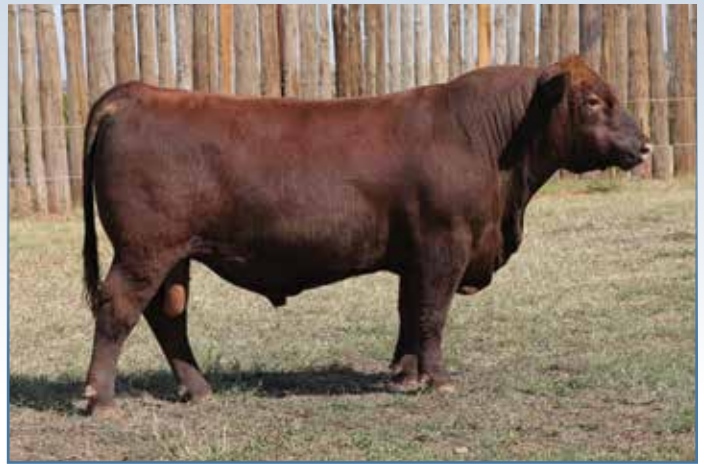
Lot 34 - MF POKER FACE 9238 392