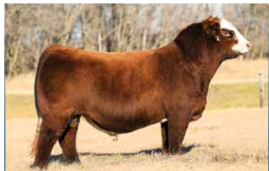
TRCC PANDEMIC - $300,000 Sire of Lot 19