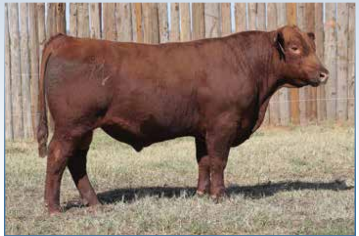
Lot 30 - MF JOKER 963 396