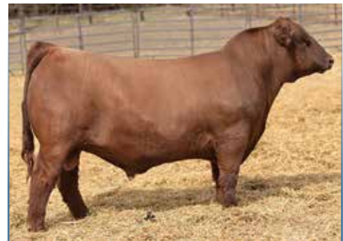
WEBR MAXED OUT 627 - Sire of Lots 23-25