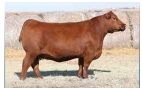
MF EDEN'S COWGIRL 3425 Dam of Lots 37 & 38