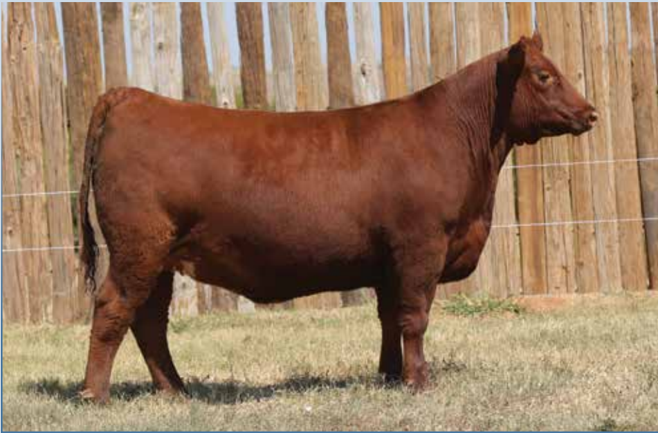
Lot 13 - MF RACHEL 7908 379