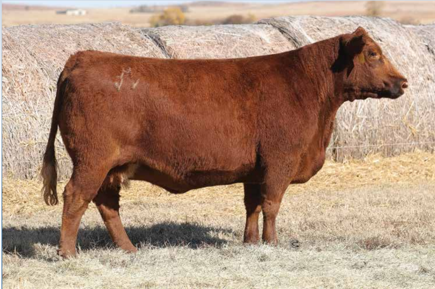
Lot 1 - MF LAKINA 6234