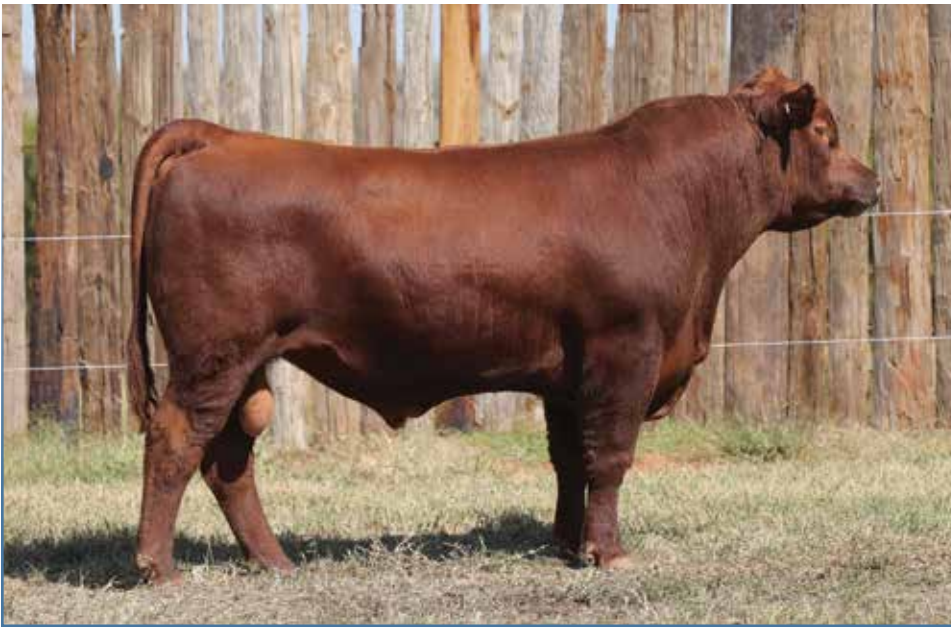
Lot 38 - MF BEARTOOTH 3425 334