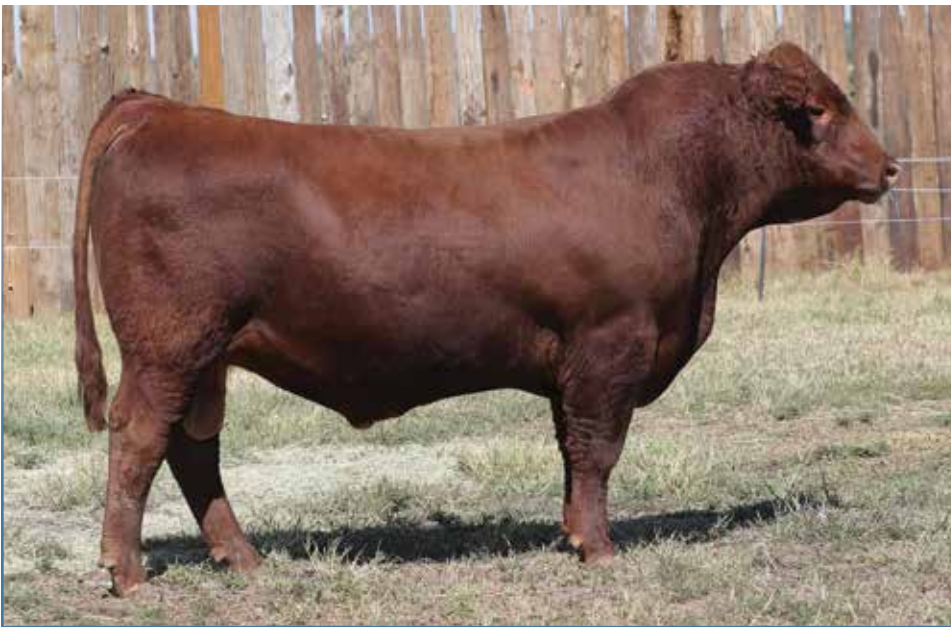
Lot 40 - MF SUDDEN IMPACT 3425 3258