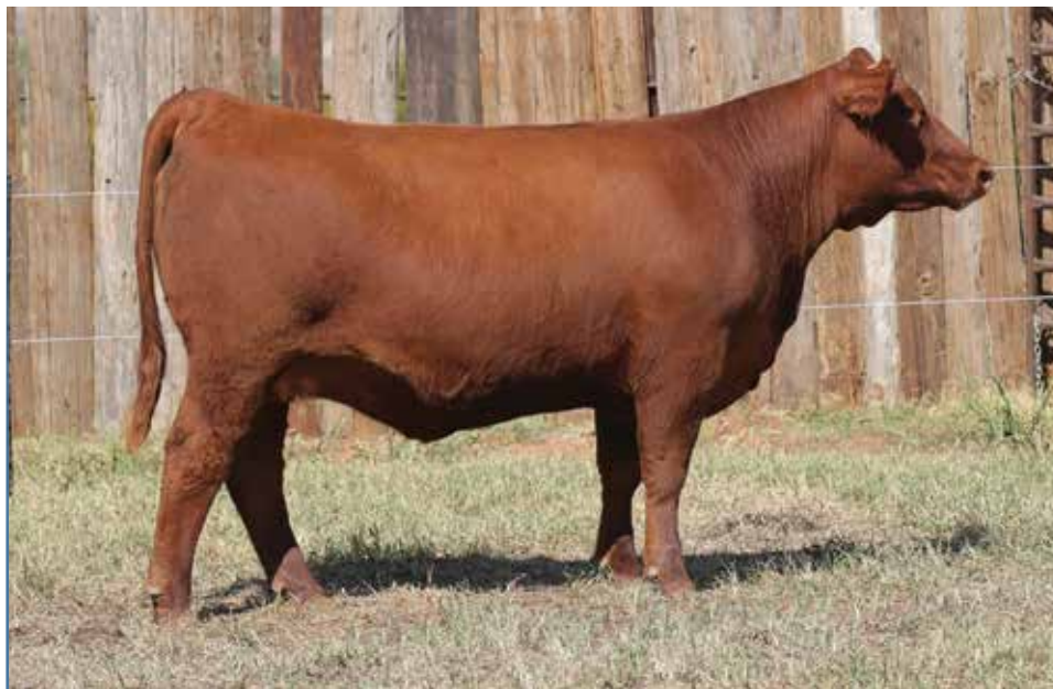
Lot 14 - MF RED RUM 076 3076