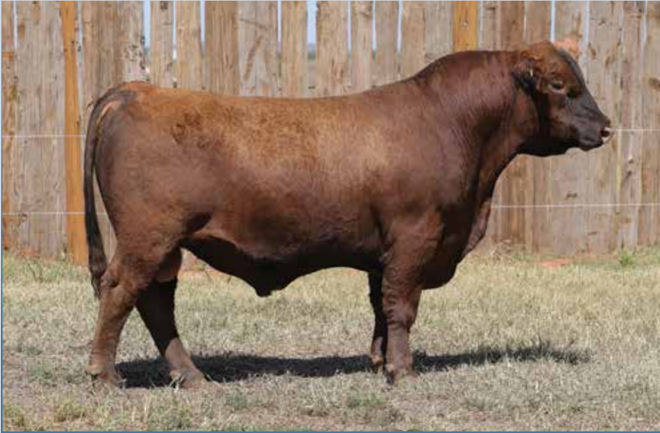
Lot 39 - MF BEARTOOTH 3045