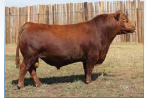
4MC FRANCHISE 1227 - Sire of Lots 41 & 42