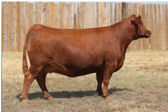
MF MARILYN 7190 - Dam of Lot 2