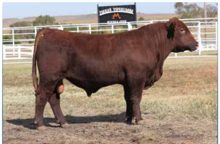
Lot 36 - MF ATOMIC 6133 3133