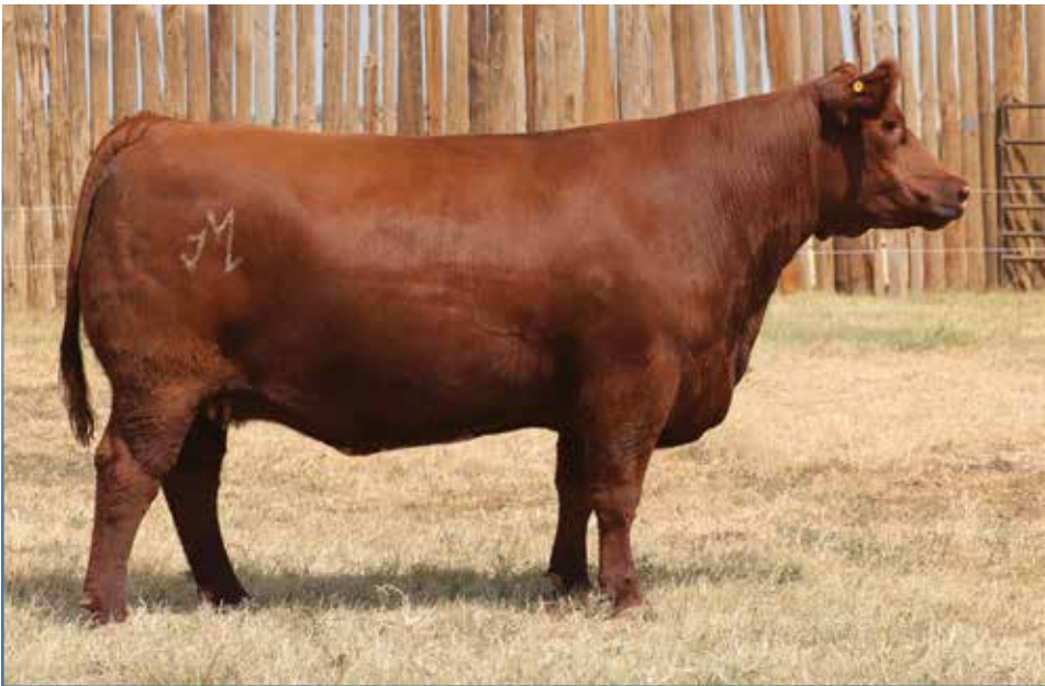
Lot 4 - MF MARY 6238 2238