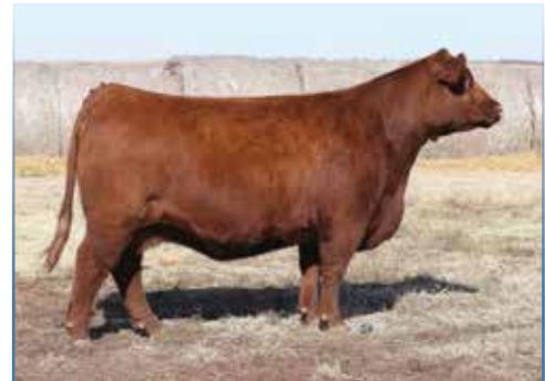
KIP MS C237 MIMI H31 - Dam of Lots 23-25