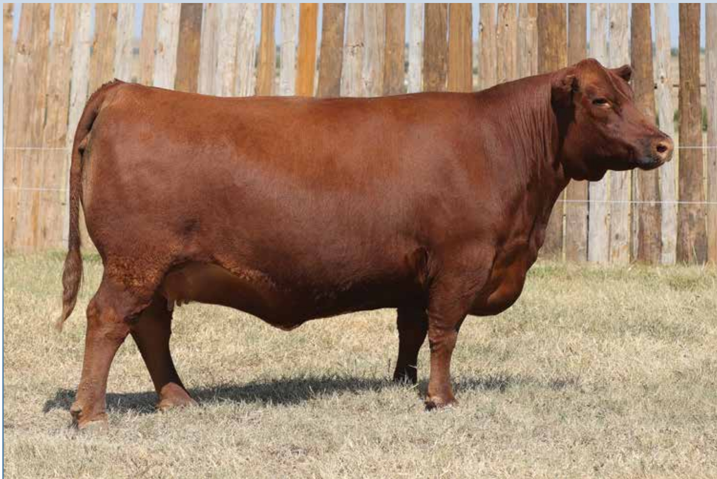
Lot 2 - MF MARILYN 1719