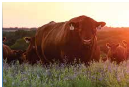
RED SOO LINE POWER EYE 161X Sire of Lot 1