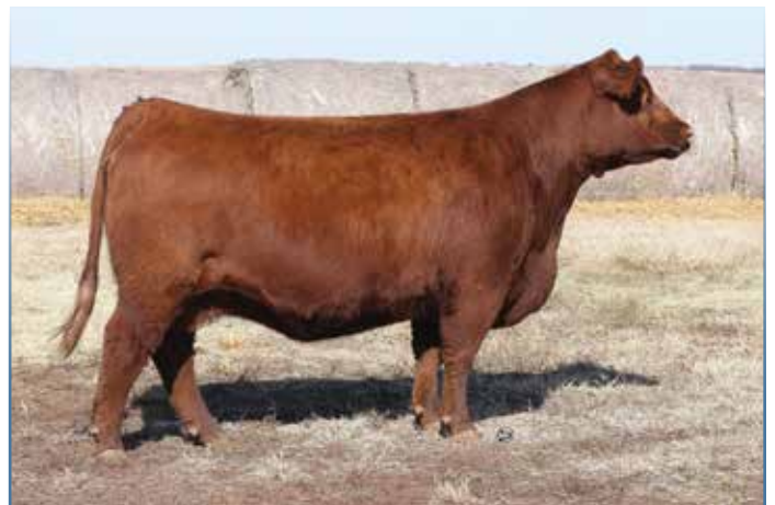
KIP MS C237 MIMI H31 - Dam of Lots 7 & 8