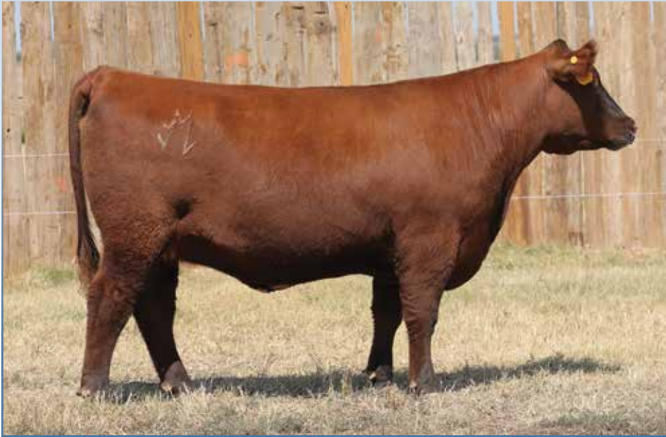
Lot 9 - MF RACHEL 2111