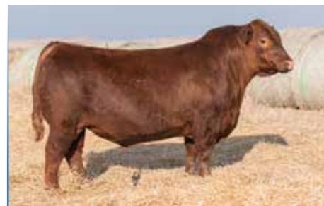
PIE FUSION 576 - Sire of Lots 11 & 12

DUE TO CALVE 1/7/25 TO 4MC FRANCHISE 1227 (RAAA: 4509119).