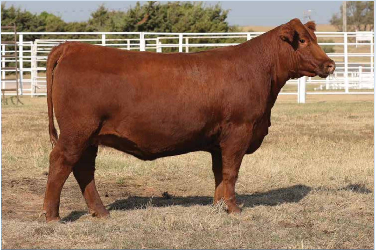
Lot 19 - MF COCO 9023 99 399