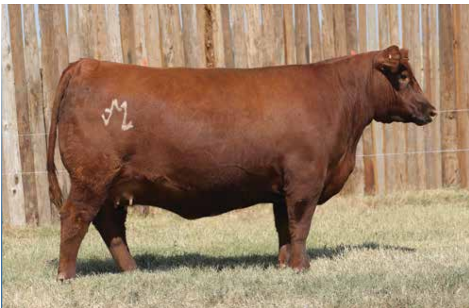
Lot 7 - MF CLAIRE 031 231

DUE TO CALVE 10/25/24 TO 4MC FRANCHISE 1227 (RAAA: 4509119).