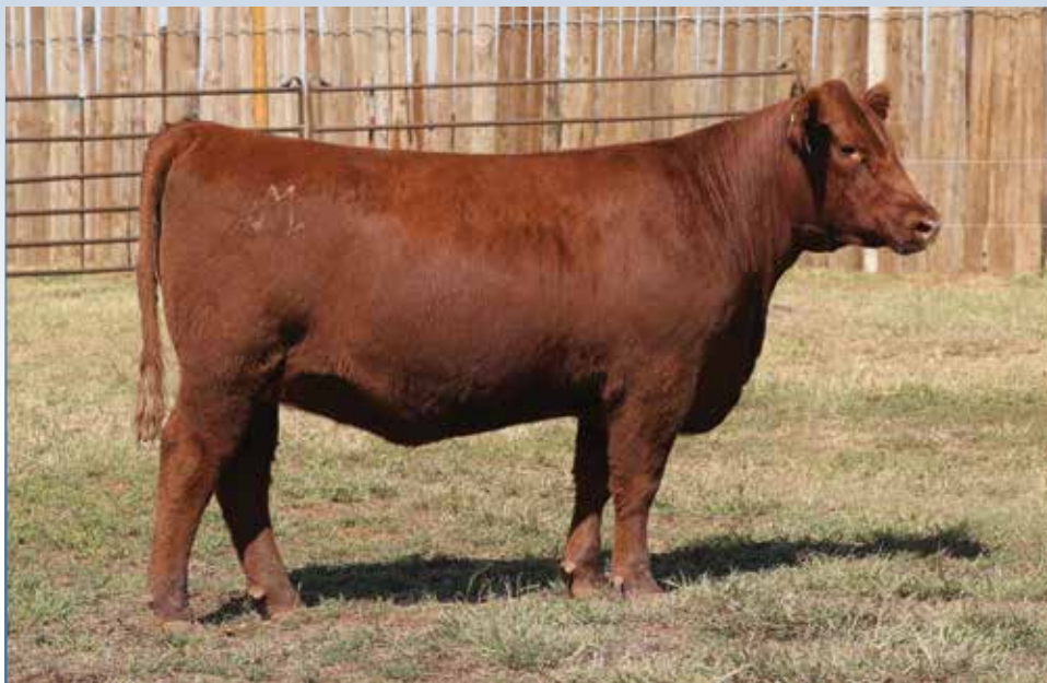
Lot 11 - MF RACHEL 1111 384