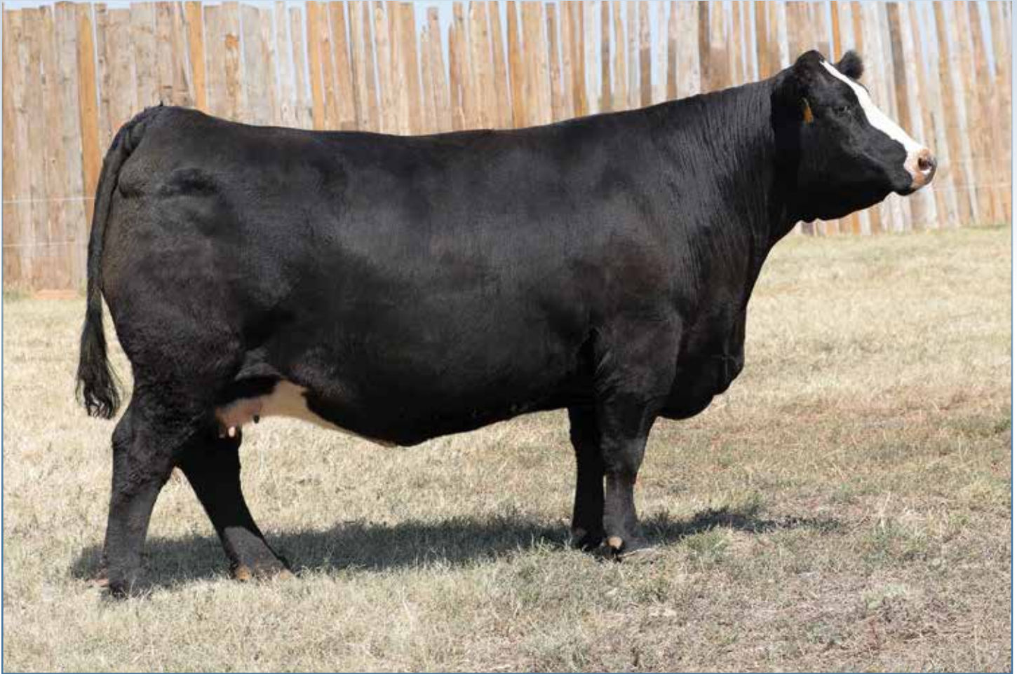
Lot 21 - TAY HONOR KATE 5H ET