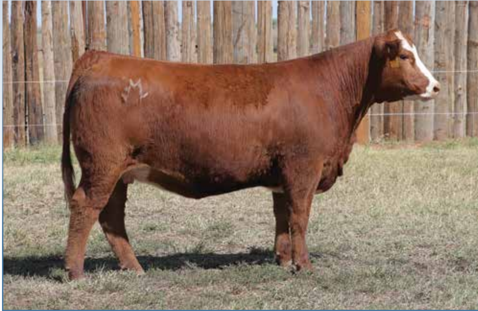
Lot 20 - MF STORM 395