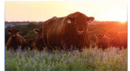
RED SOO LINE POWER EYE 161X Maternal Grand sire of Lot 27