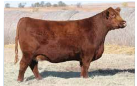
MF ELLA 062 - Dam of Lot 3

DUE TO CALVE 10/25/24 TO 4MC FRANCHISE 1227 (RAAA: 4509119).