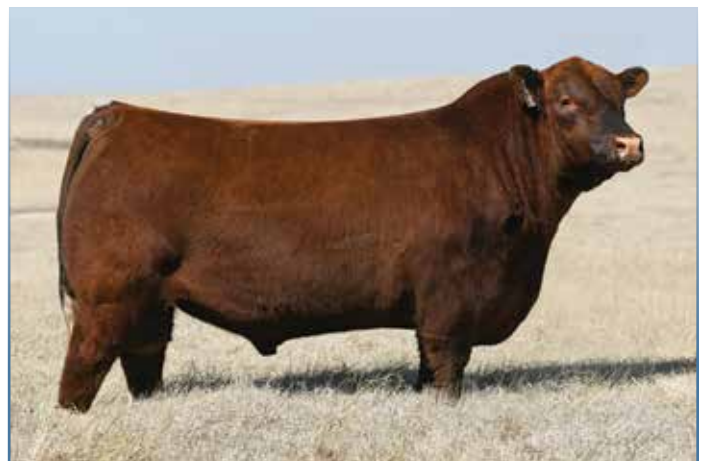
MANN RED BOX 55C - Paternal Grandsire of Lots 26-28