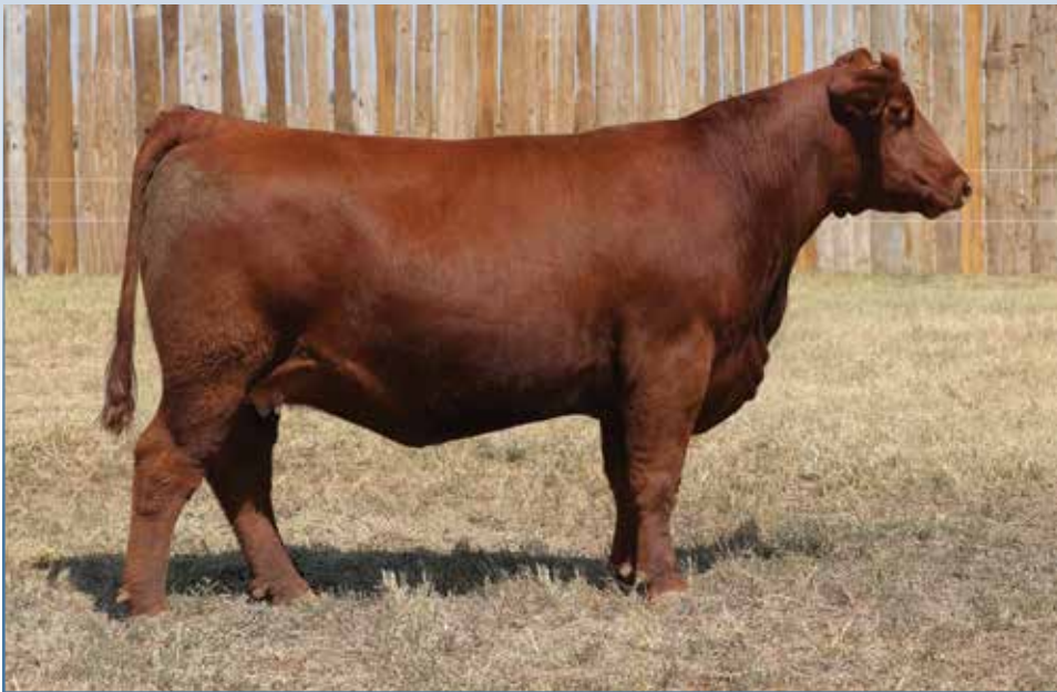
Lot 6 - MF HAZEL 3971