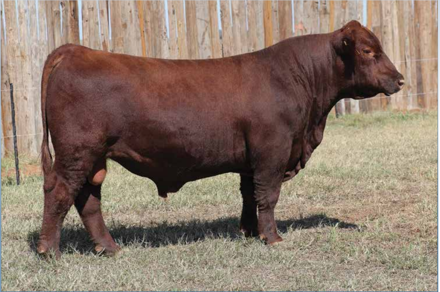
Lot 24 - MF MAXED OUT 031 337