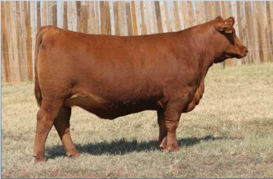
Lot 17 - MF LEXIE 634 334