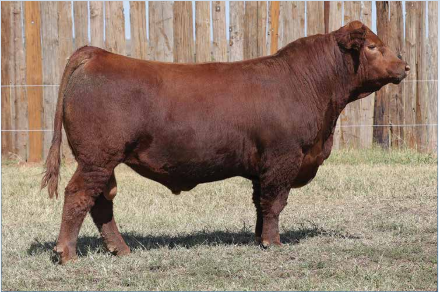
Lot 33 - MF RELOAD 7190 371