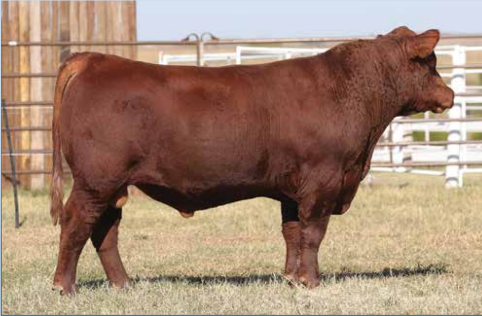
Lot 41 - MF FRANCHISE 1928 319