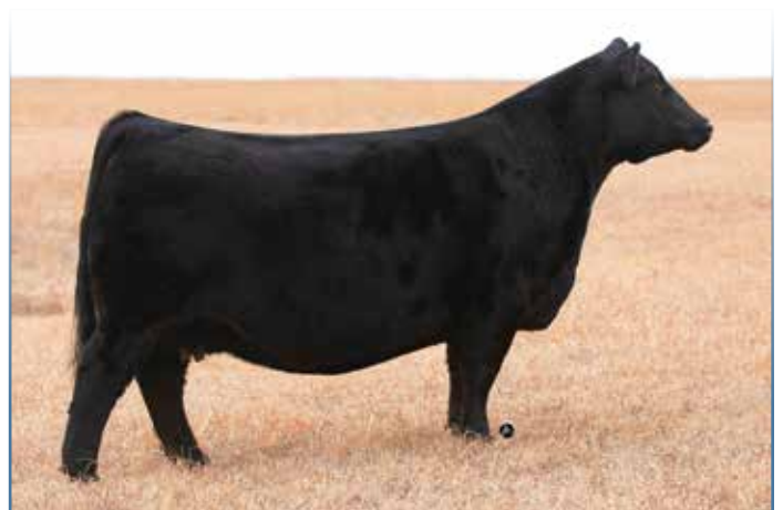
SFI MISS KISS THIS C3M - Dam of Lot 22