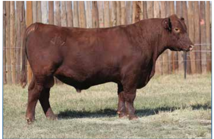
Lot 31 - MF BOXER 6238 3238