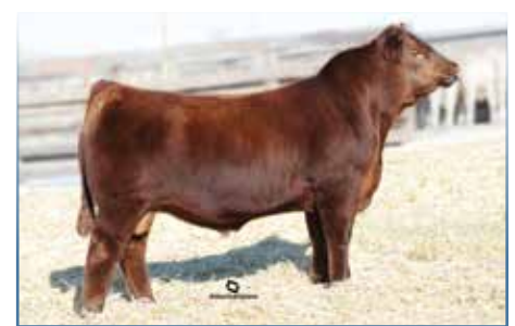
MF SUDDEN IMPACT 1208 - Sire of Lot 18

DUE TO CALVE 3/1/25 TO RED U2Q HEAD GAMES 14H (RAAA: 4614707).