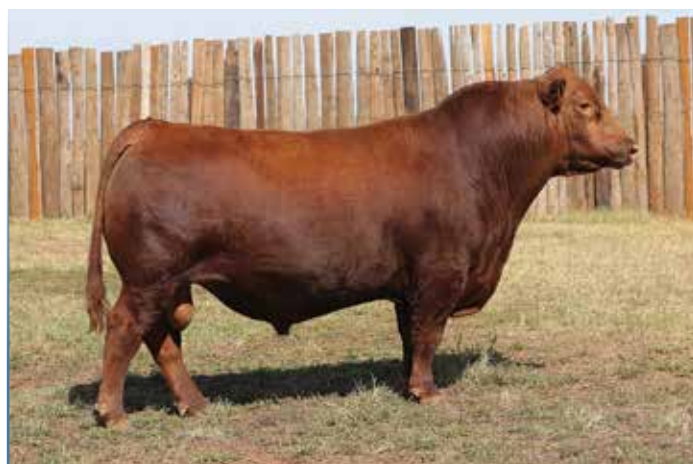
4MC FRANCHISE 1227

Service sire to several females throughout the offering!