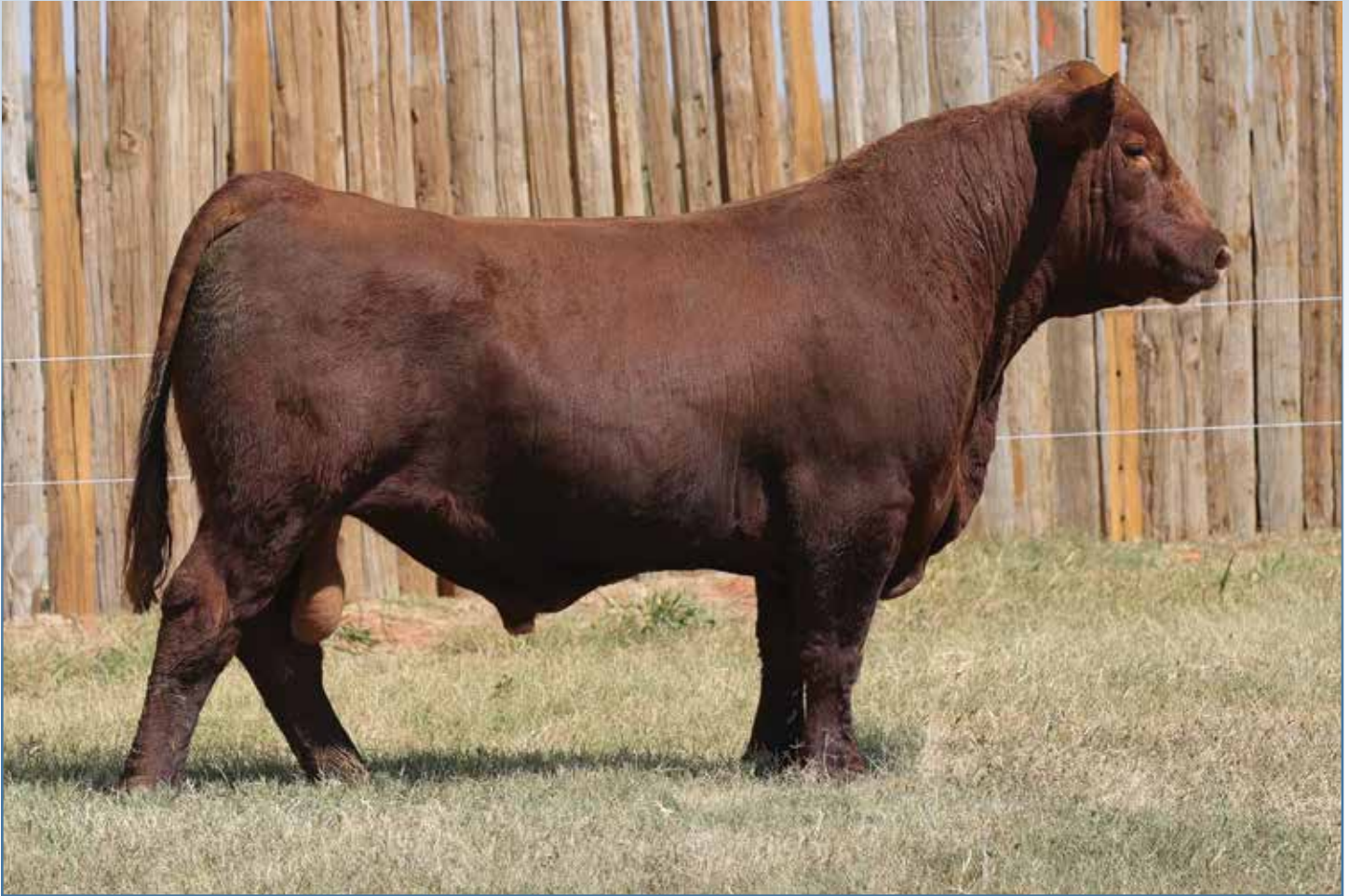
Lot 29 - MF JOKER 8915 389