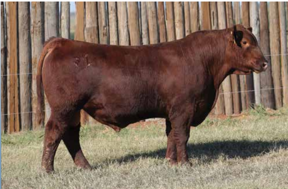
Lot 42 - MF FRANCHISE 9335 393