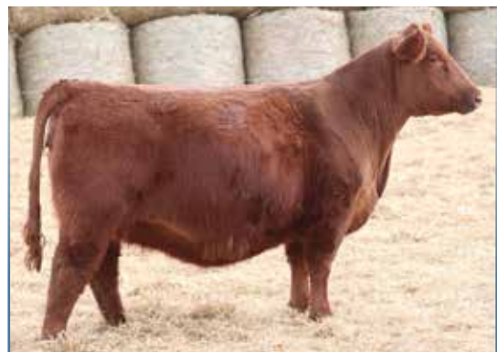
W/C GCC S-H MISS SODAK 2609K $60,000 Maternal Sister in Blood to Lot 19