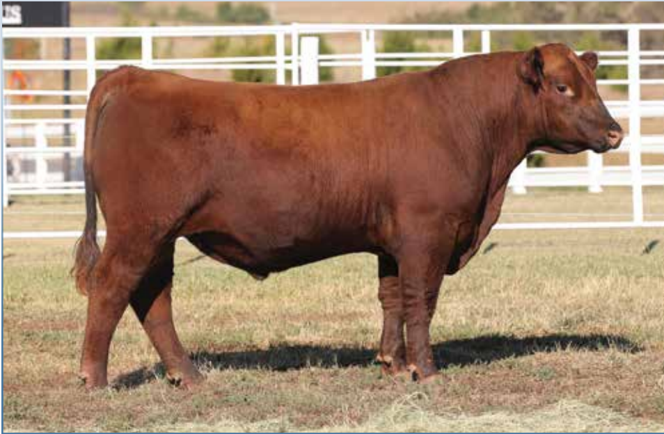
Lot 43 - MF EAGLE 210 3210