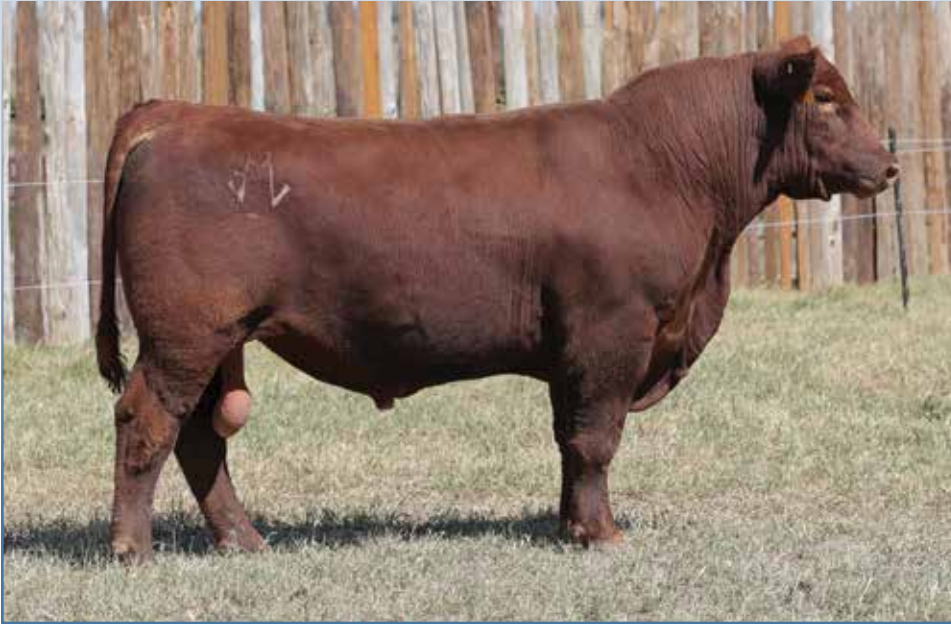
Lot 27 - MF RED BOX 8950 350