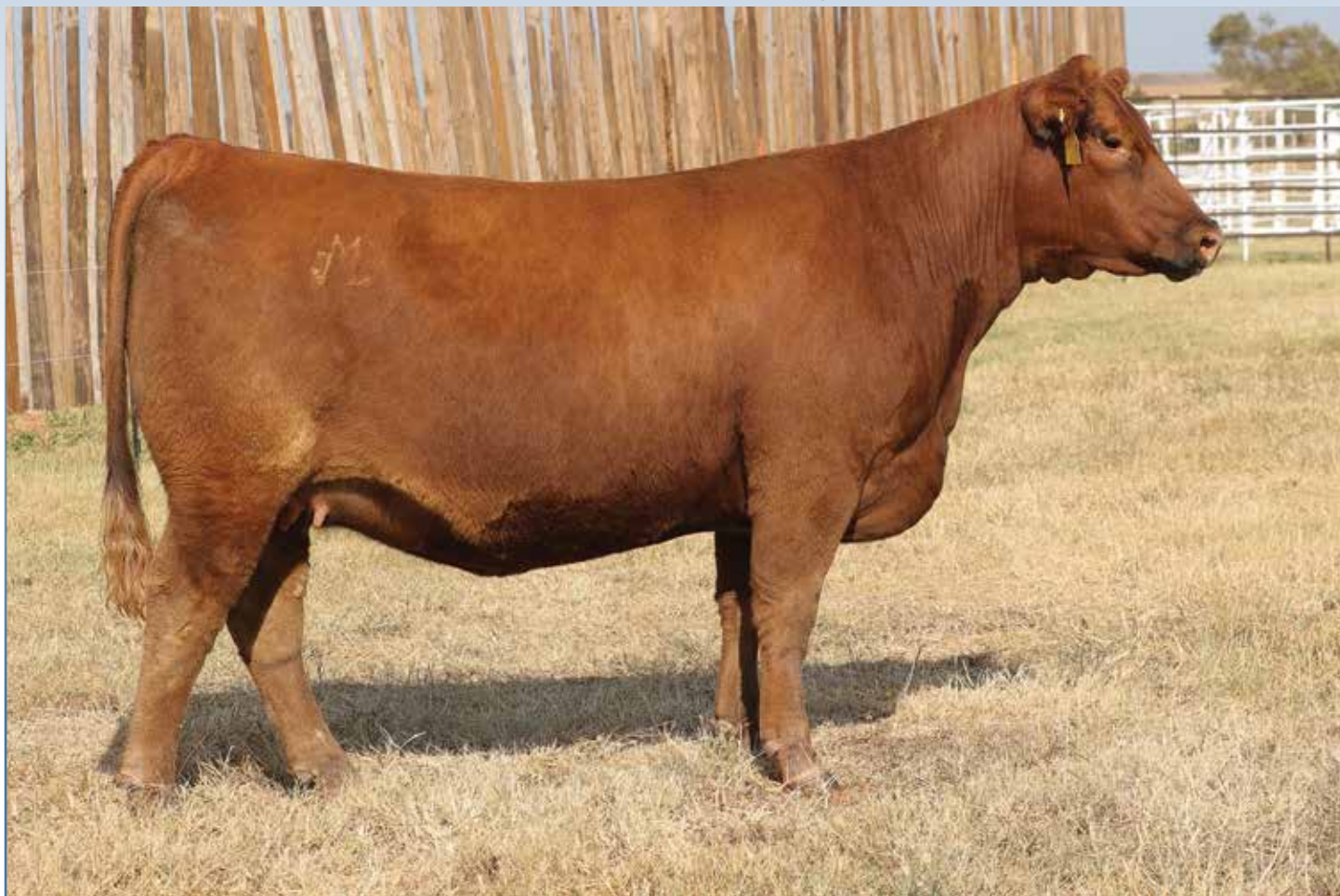
Lot 5 - MF NANCY 5153 1004 2004