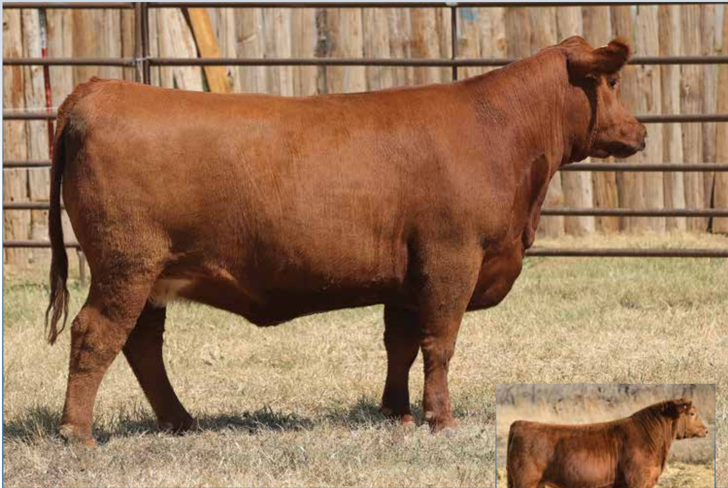
Lot 16 - MF DONNA 3425 3628