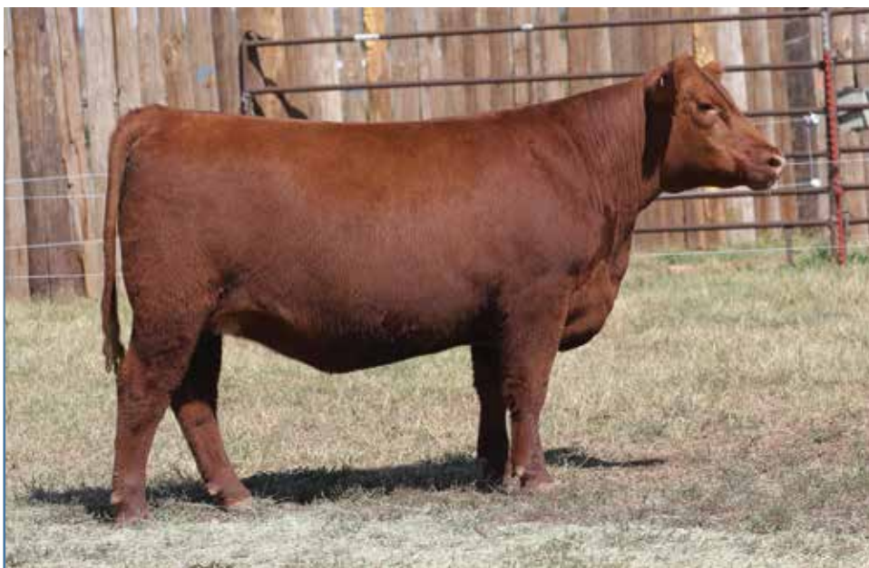
Lot 12 - MF RACHEL 1111 337