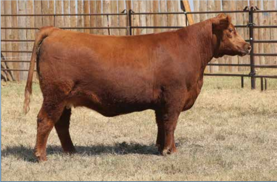
Lot 3 - MF ELLA 062 206