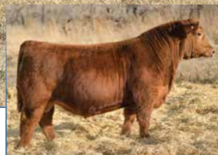
RED U2Q HEAD GAMES 14H Sire of Lots 15 & 16