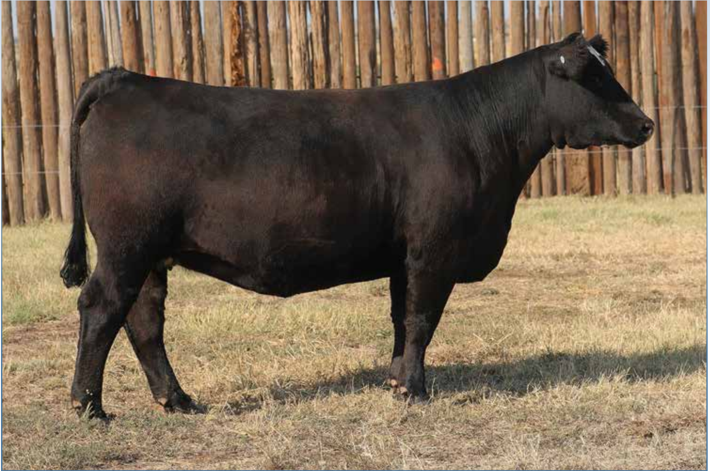
Lot 22 - GPAR MISS KISS 284