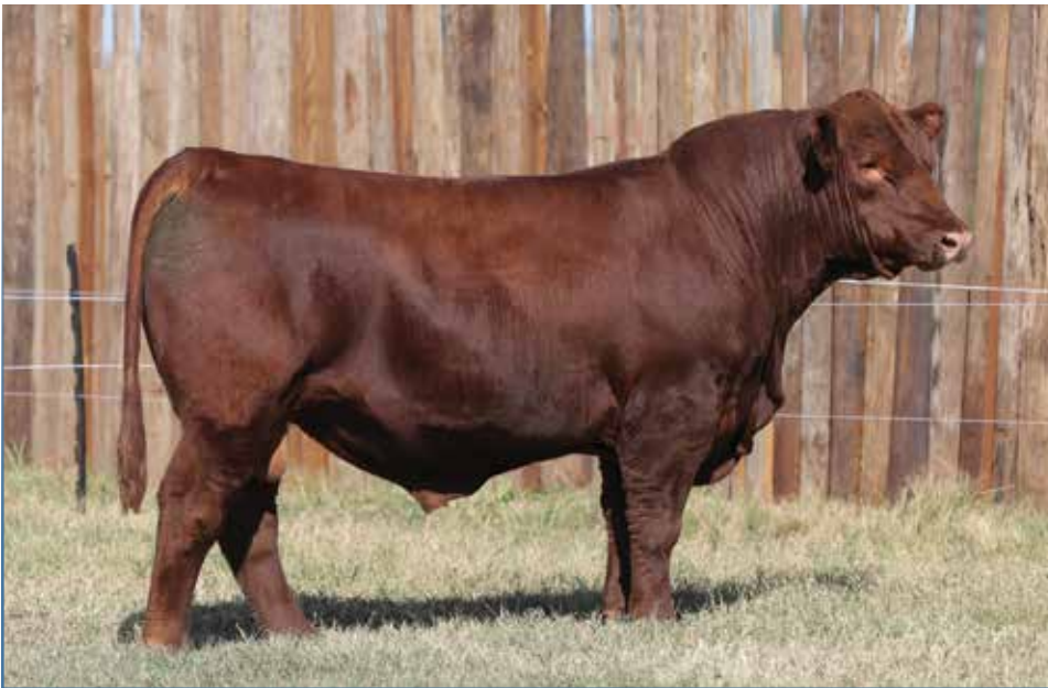
Lot 28 - MF RED BOX 6359 359