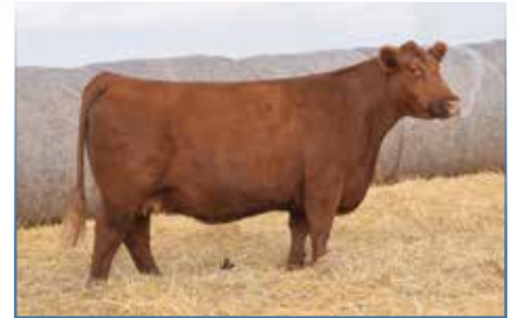
RACHEL - Dam of Lots 9-12

DUE TO CALVE 12/15/24 TO RED U2Q HEAD GAMES 14H (RAAA: 4614707).