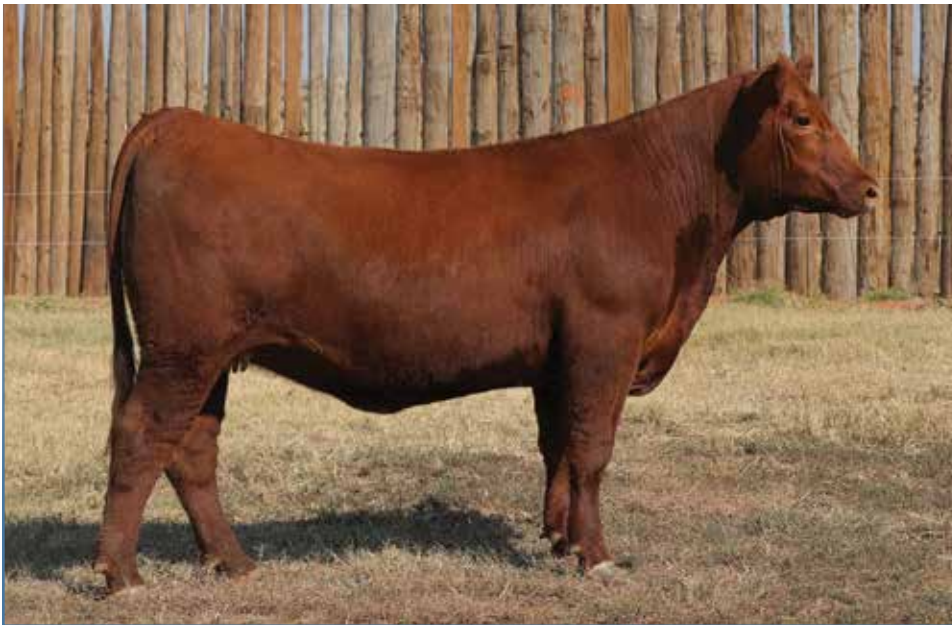
Lot 10 - MF RACHEL 1111 743 2743