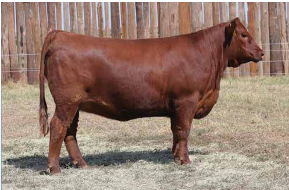
Lot 18 - MF COWGIRL 3425 93 393

DUE TO CALVE 1/20/25 TO RED U2Q HEAD GAMES 14H (RAAA: 4614707).