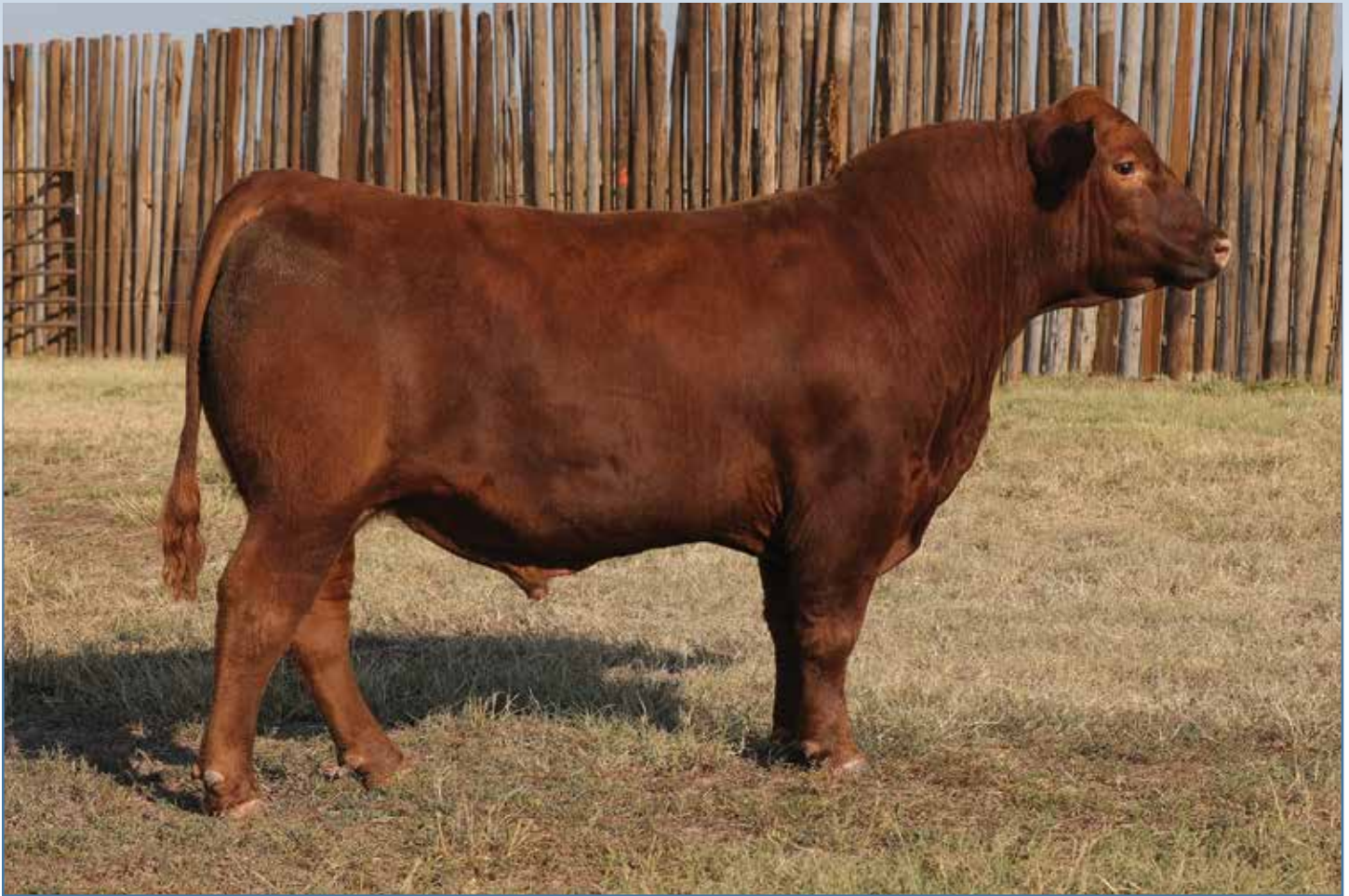
Lot 26 - MF RED BOX 1463 314