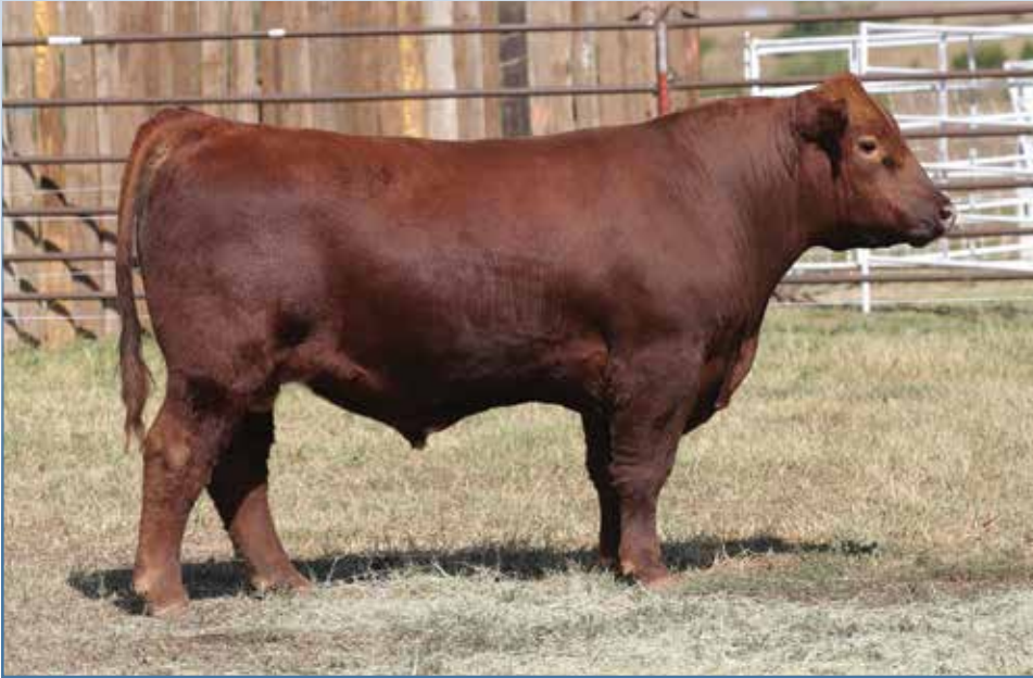
Lot 37 - MF BEARTOOTH 3425 367