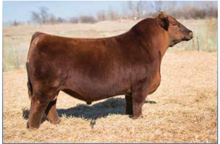
MF POKER FACE 7862 PATERNAL GRANDSIRE OF LOTS 33 - 35