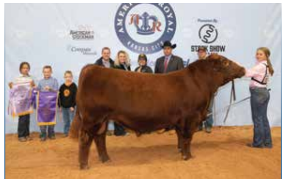
MF JOKER 962 - Sire of Lots 29-33