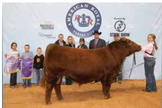
MF JOKER 962 Son of Lot 1