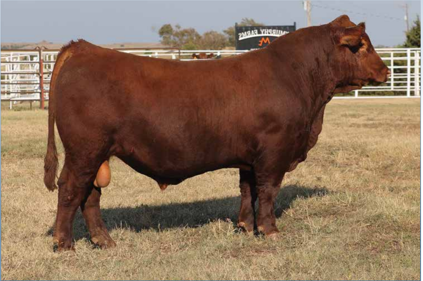
Lot 23 - MF MAXED OUT 031 365