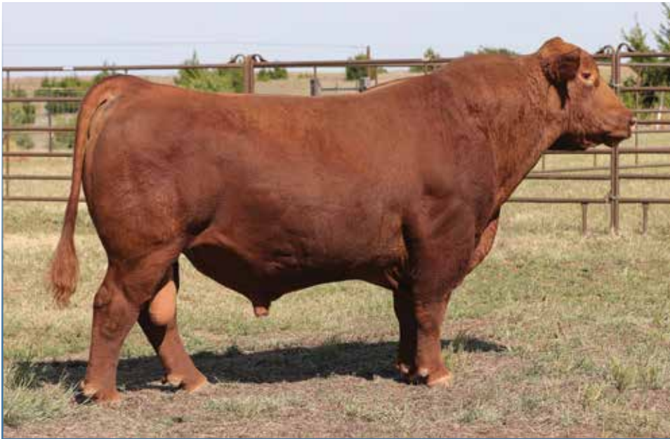
Lot 44 - BIX MR PTO 399