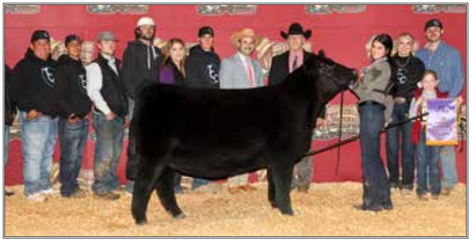
3BCC SWC KALI 613K DAUGHTER OF LOT 50