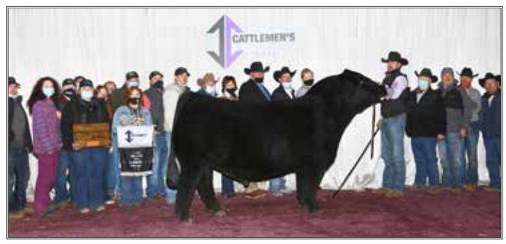
SO REMEDY 7F SIRE OF LOT 20 2021 CATTLEMEN'S CONGRESS GRAND CHAMPION PUREBRED SIMMENTAL BULL

Over the years I have heard a lot of breeders say that they want nothing to do with an animal under the influence of MR TR Hammer 308A and I constantly find myself saying that I don't think you can get enough of it because the daughters we have, have been awesome in production! A direct daughter of "Hammer" arguably raised our best natural heifer calf in 2024 by WINC All Right, WLE Shez It C056 raised multiple high sellers for The Black Label sale series, and KCC1 Havana 83E is a daughter of MR TR Hammer 308A as well as her flush mate brother known as KCC1 Exclusive 116E.