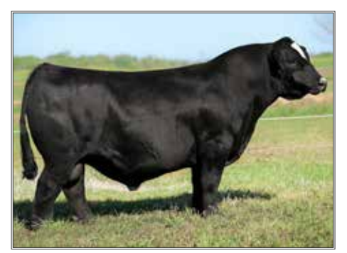
KCC1 COUNTERTIME 872H SIRE OF SEVERAL OF THE BRED HEIFERS IN THE OFFERING

Strong cow family and definitely one of the very best from a great set at Sheffield Ranch. This bred female has a maternal sister selling as lot 32. The first daughters of KCC1 Countertime 872H entered production this past spring! What an amazing set of calf raisers out at Kearns Cattle Company. This particular bred female is very complete in her build and kind with the right body shape and skeletal integrity.