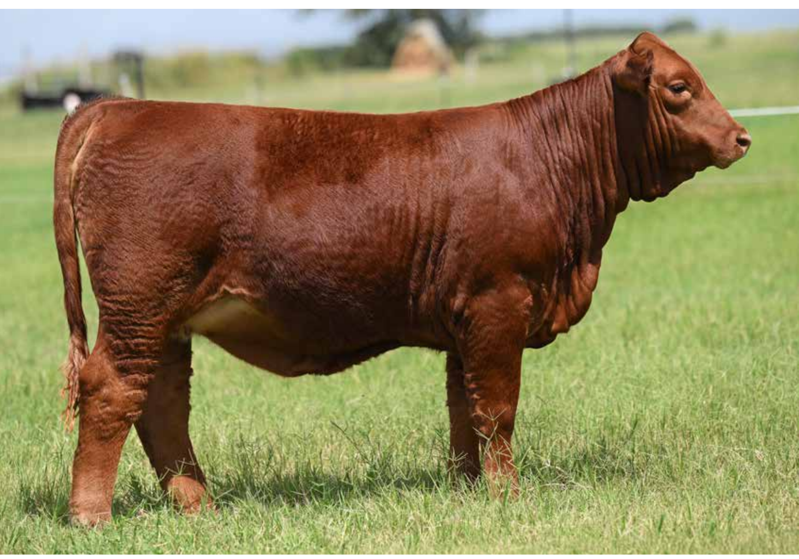
WSRC IDABEL 410 M