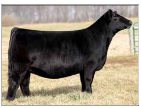
JSUL MARYS PROUD 1002J DONOR DAM OF LOTS 11 & 12. PAST HIGH SELLING SALE FEATURE FOR SCHAEFFER AND TICE.

If you like them cool featured and complete with noteworthy pedigree and a story that just needs added to for marketing, then take a serious look at this pair of sisters. Some of the very best from Bird Cattle Company are within the pages of this sale book and it starts with the influence of the Triple Crown winning JBSF Proud Mary influence.