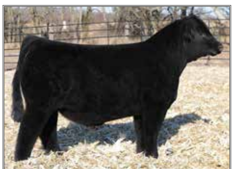
3BCC KCC1 KRYPTON 100K

today! Two proven and powerful maternal sisters born in the same calving season "83E" by MR TR Hammer 308A and "510E" by TL Bottomline from the late TKCC Victoria 57A influence, the pathway that they paved is one that we see Lot 8 will follow. Incredible look with the power and shape necessary to deem her a 'short lister' on sale day. Her sire was quite possibly one of the best we have raised to date on Texas soil, so please take serious note of the potential and possibilities that this one could bring to any barn or program nationwide.