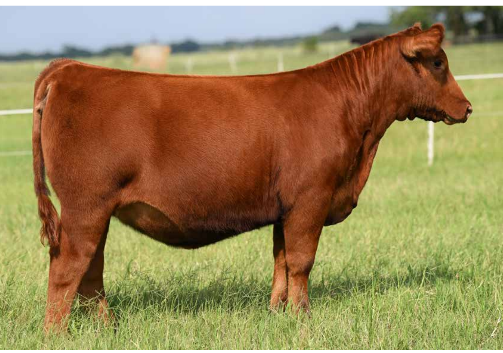
BJCC MIA 2404 OFFERED BY: BLACKJACK CATTLE COMPANY