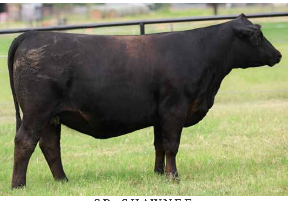
SHAWNEE OFFERED BY: SHEFFIELD RANCH

A solid black female that sure has the kind and credentials to make an outfit money when we start to factor in pounds produced in this aggressive marketplace.