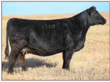
KCC1 GWEN 9073G DAM OF LOT 38