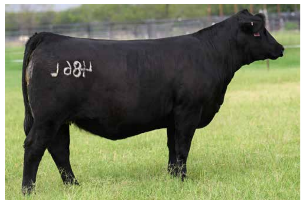
ANNIE K 486 L

A productive and broody pair of maternal sisters from SWC HOC Annie K 214C who are very similar kind and sired by very fundamental and quality sires of distinction in KCC1 Countertime 872H and MR HOC Broker.