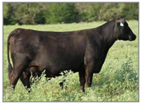
B3R E258 NANCY Z180 R039