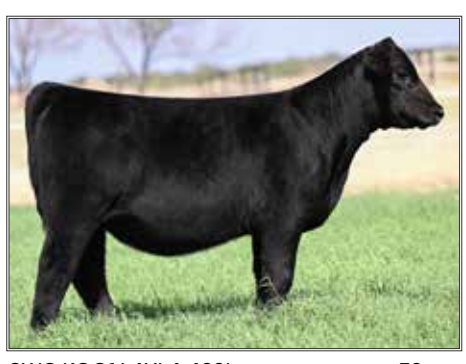
SWC KCC1 LAYLA 483L FULL SISTER TO LOT 70 OWNED JOINTLY WITH LAUREN MOHR AND BRANDON JOCHIMSEN

This female brings the added length, size, and substance from both sides of her genetic equation. Not your typical SimGenetic female, a pinch more elevated, with a shot more pin width and back shape.