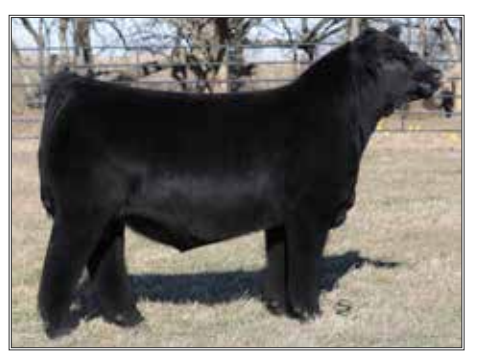
STCC TECUMSEH 058J THE $620,000 SIRE OF LOT 27 & 28