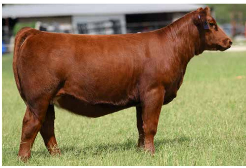
DREAM MISSY OFFERED BY: DEBERRY CATTLE & SHIPWRECK CATTLE

As we stick with the W/C Red Bird 269J sire group we find a sultry redhead from a duo of past Black Label sale features. Lot 13's maternal granddam, HOC Dream Tiara 131D, commanded a hammer price of $32,000 and has produced countless females for the Bird firm of West Texas who have averaged well in her tenure with the dam of this particular lot to be her highest-selling one at auction with a $38,000 bid from the DeBerry family.