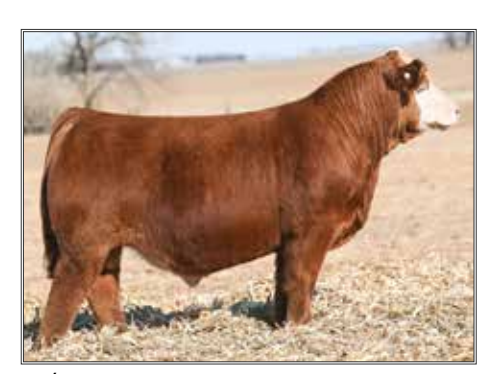
W/C RED BIRD 269J $90,000 SIRE OF LOTS 11-15