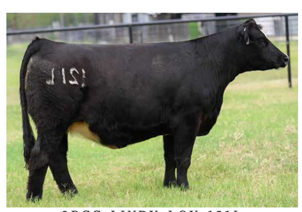
3 BCC LINDY LOU 121L OFFERED BY: SHIPWRECK CATTLE & 3B CATTLE COMPANY