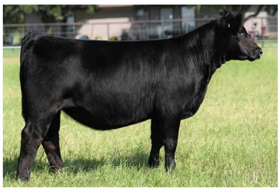
O MAGNOLIA 161 M OFFERED BY: BAR O CATTLE COMPANY BAR

The dam of this female would be a full sister to the G.O.A.T himself, Mr HOC Broker. SWC M2C Zereasa 825Z has been a consistent generator of cash and quality for the Bar O Cattle firm of Kansas since she entered production. She has an average on 5 open heifers sold to date of $14,600.