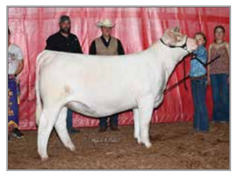
AC MS PEARL 2502 3/4 SISTER TO THE MOTHER OF LOT 40