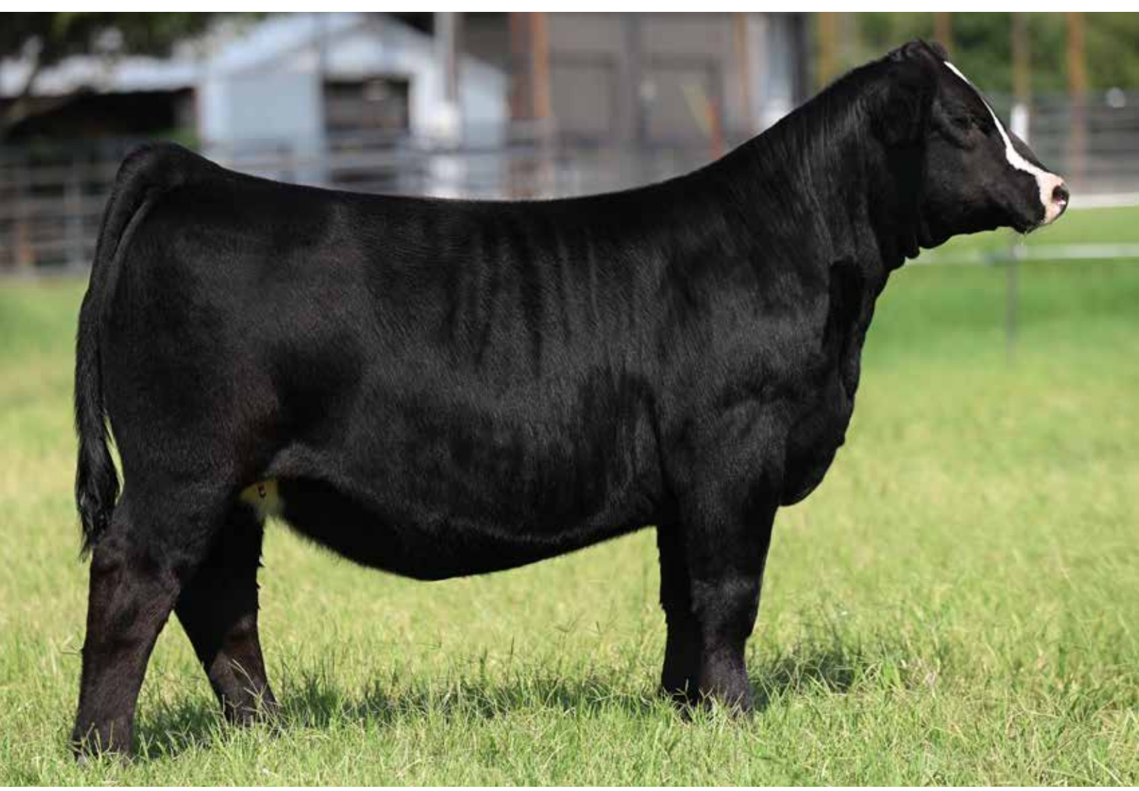
KK JARR MISSY 491M OFFERED BY: RICHBURG CATTLE & KROEGER KATTLE COMPANY

In my opinion, this is one of the truly great breeding pieces of the sale offering that offers a slightly different genetic twist. She's not a true outcross by any stretch of the imagination but she does have slightly different credentials than the popular mainstream.