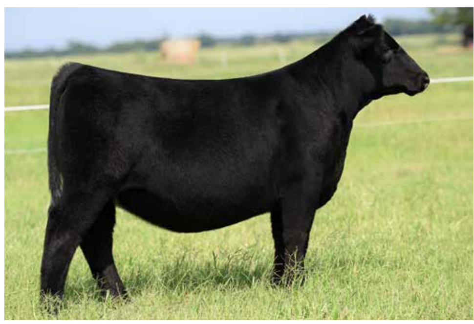
-SR-MYSTIC FLIRT OFFERED BY: SHEFFIELD RANCH & SHIPWRECK CATTLE

The next daughter of Next Level just happens to from a maternal sister to the Triple Crown Winning JS Black Satin 9B more commonly referred to as "Boots", sired by W/C Relentless 32C. JS Flirt A Way 76H competed in one of the most competitive classes in Simmental Show Ring history. Nine different heifers were never placed the same way by any evaluator they were campaigned under. Each of them had their qualities as well as their faults, regardless they were all quality females and should resurface in production.