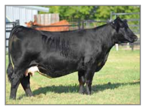
SWC HOC ANNIE K 214C DONOR DAM OF LOTS 62 AND 63

A.I. BRED ON 4/23/24 TO ZTGC JUST CUZ 52K (ASA# 4063644) WITH AN EXPECTED CALVING DATE OF JANUARY 30, 2025.