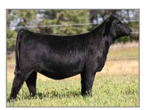
A-C | FGENDARY MISS 23151 MATERNAL SISTER TO LOT 65

Expect the mating to ZTGC Just Cuz 52K to add lower body shape and transitional smoothness to the resulting calf in January.