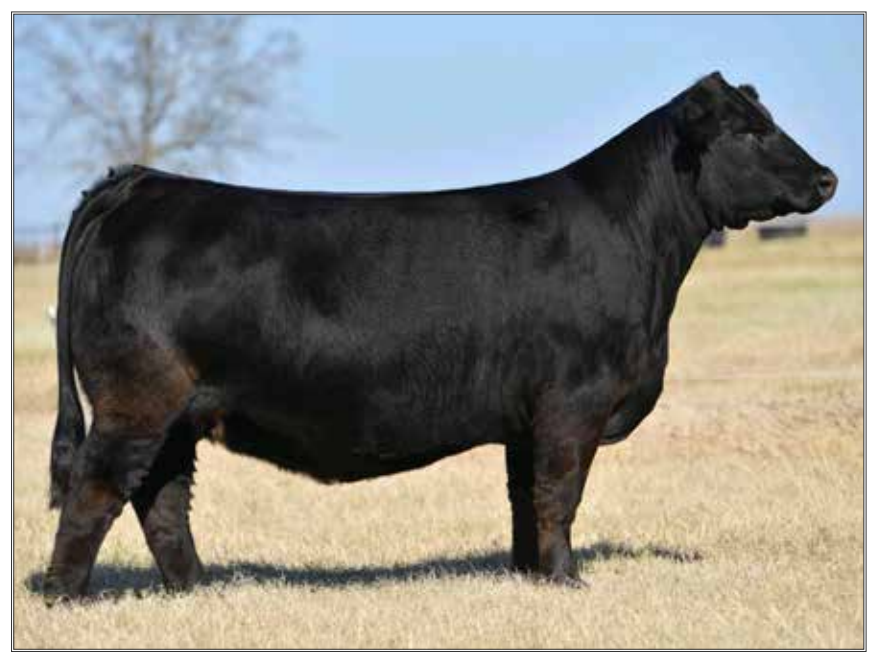
BLC1ESTELLE 373E DAM OF LOT 72

The influence of the female maker GCC Total Recall 806T with the blend of the Revolution Rose cow family establishes even further reason to invest in a big, deep bodied, genuine built female.