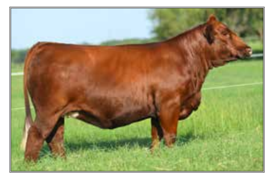
HOC DREAM TIARA 131D DAM OF FLUSH LOT 100

CE BW WW YW MILK API TI 13.6 -1.6 52.3 71.7 22.2 123.9 67.7