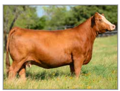
KCC1 TIARA 131Z DAM OF LOT 51 OWNED BY NIXON FAMILY FARMS