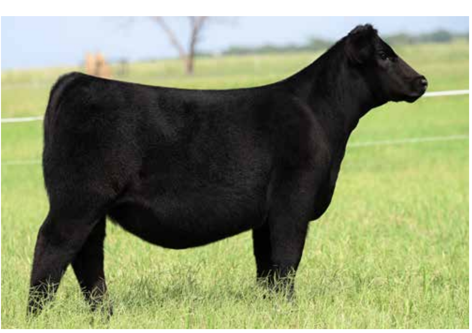
SWC LJR FOREVER MISS OFFERED BY: SHIPWRECK CATTLE & JACKSON CATTLE LJR