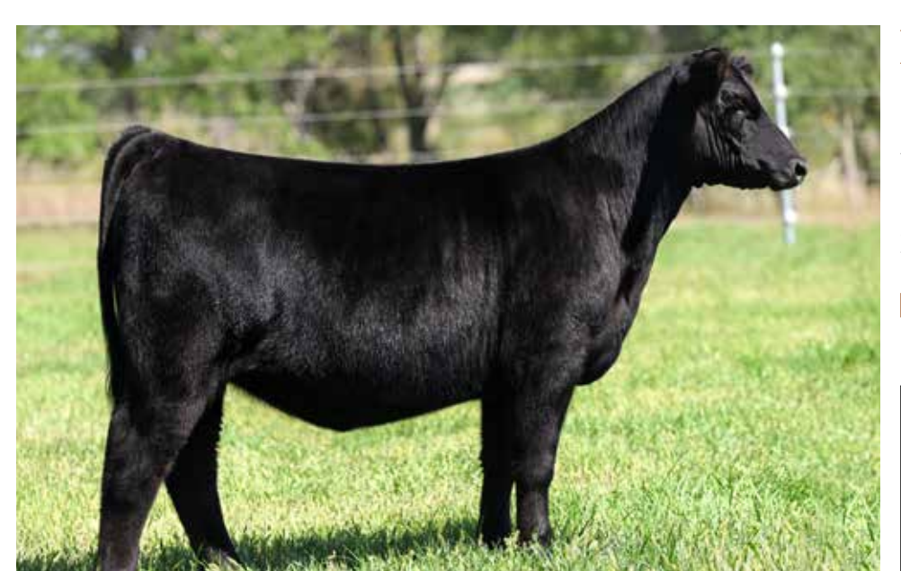
JSUL L REBA 449 OFFERED BY: ANDERSON CATTLE

In this evolving business, where even if we don't like to admit it, bigger is better, you may find