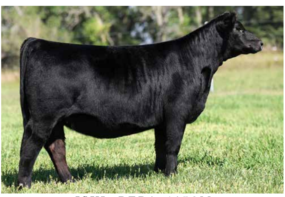
JSUL REBA 4156M OFFERED BY: ANDERSON CATTLE

They are daughters of JSUL Something About Mary 8421 and backed by the 2021 American Royal Supreme Champion Junior Breeding Heifer, JSUL Oh Boy Reba 0276G. Their maternal granddam is the iconic DAF Reba C85, the 2016 NWSS Grand Champion Percentage Simmental Heifer. A full sister to her maternal granddam, DAF Reba C707, followed in her sister's footsteps the following year when she was slapped Grand Champion Percentage Simmental Heifer at the 2017 National Western Stock Show. It's no secret that the famed "Reba" cow family has been instrumental in the success story that surrounds the Sullivan Farms Simmental breeding program. Striking looks, powerful composition, and built for the long haul - dig your heels in here!