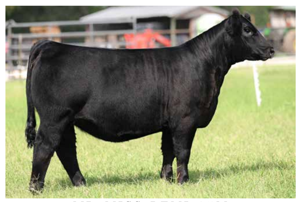
MR MISS REMI 35 M OFFERED BY: MADDEN ROSS & SHIPWRECK CATTLE M R

We are sure that many of you will find this daughter of the $620,000 STCC Tecumseh 058J very intriguing. The cross on the daughters of SO Remedy 7F is a sure thing when it comes to completing the equation for the quality and body shape that's in demand. This individual is extended and high tying out of her blade with impeccable spinal integrity, a desired pin set that is set wide with a tailhead neatly laid in. She too is big in her upper rib and very uniform in her underline transitions. Shape, build, skeletal integrity, and a great disposition suitable for any exhibitor comes all-inclusive for the one that acquires on sale day.