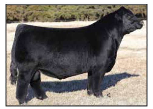
JSUL SOMETHING ABOUT MARY FULL BROTHER TO LOT 10