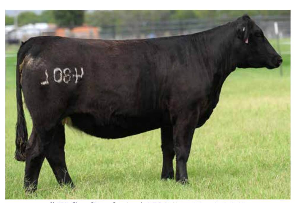
GDOT \underset{\text{OFFERED BY: SHIPWRECK CATTLE}}{ANNIE} K 480L