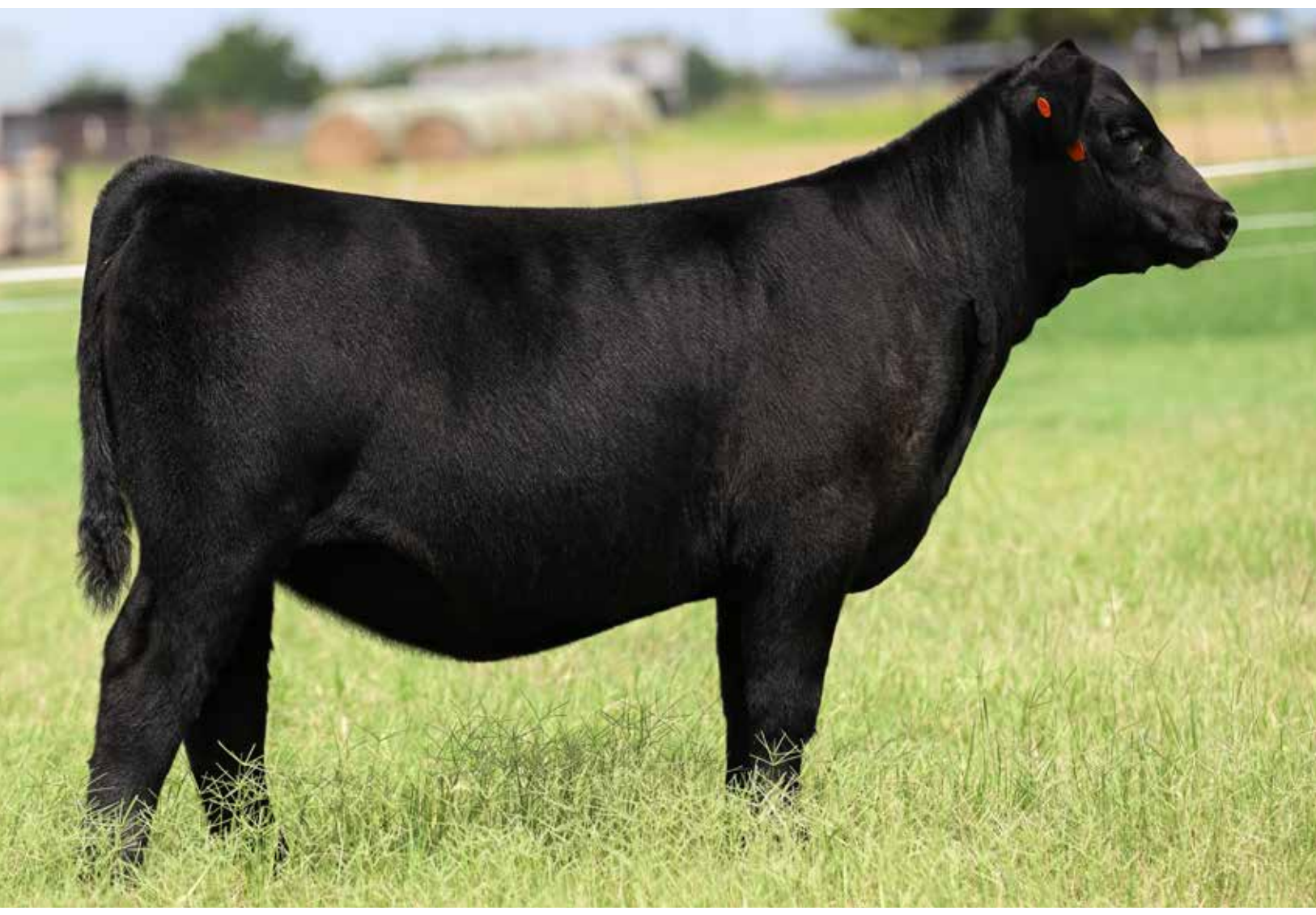
KCC1 HAVANA'S WAY 42 OFFERED BY: KEARNS CATTLE COMPANY & SHIPWRECK CATTLE 4206 M