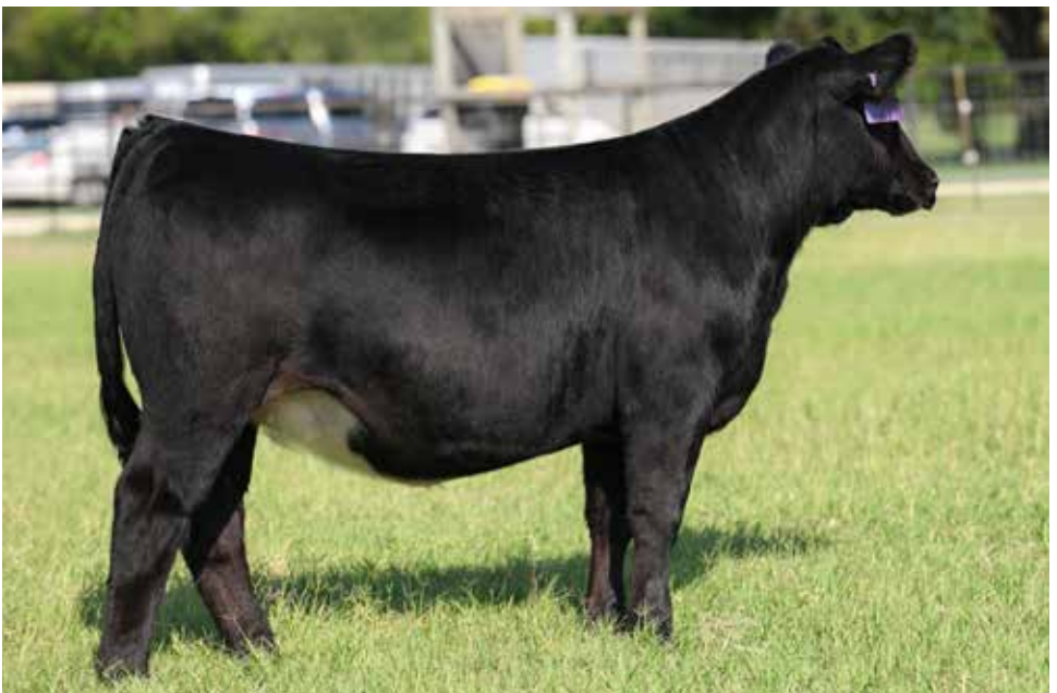
CEN MAJESTIC ROSE OFFERED BY: ALLEN RANCH & SHIPWRECK CATTLE ALLEN

We stick with the "Lock N Load" influence on the maternal side with a female sired by the past Reserve National Champion Purebred WHF/JS/CCS Double Up G365.