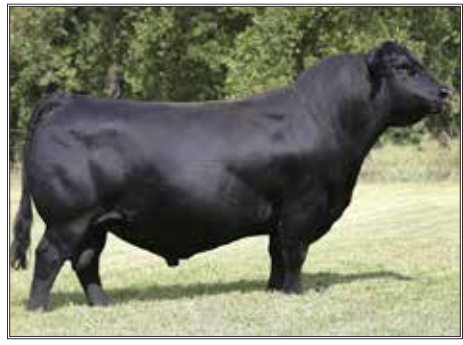
BC ROBUST 0807 SIRE OF LOT 70