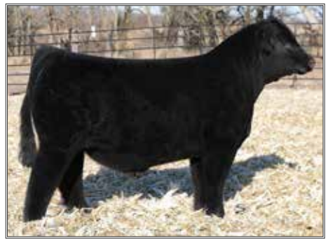
3BCC KCC1 KRYPTON 100K SIRE OF LOT 38