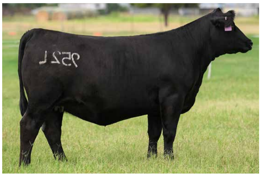
SWC \quad REVOLUTION \quad DOLL \quad 952L \quad