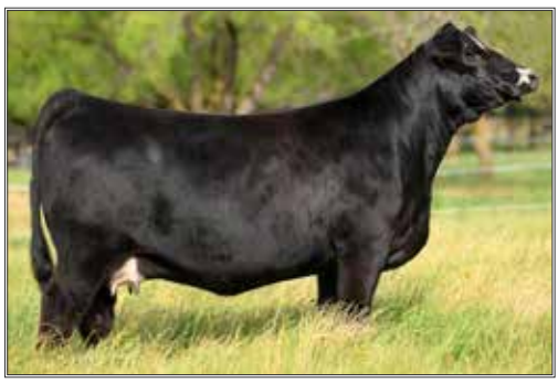
KCC1 ESTELLE 510E MATERNAL GRANDDAM OF LOTS 6-9

We bring you another direct daughter of RP-BCR Insight G302 from a young, upcoming donor dam in the Kearns Cattle Company program of Rushville, Nebraska. She hails from the same great line of donor females beginning with the foundation, Harkers Stars P117, followed by FORD RJ Dolly Y83, TKCC Victoria 57A, KCC1 Estelle 510E, and her dam KCC1 Estelle 32J by the now deceased $109,000 JBSF Berwick 41F. From a breeder's perspective, there are not many places to shop for a heifer calf worthy of exhibition or donor consideration with that many proven donors stacked for consecutive generations.