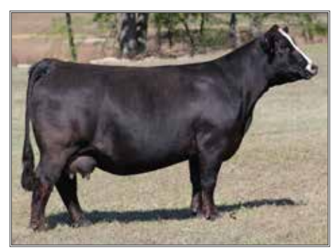
CONLEY SHEZA STAR D3 $120,000 DAM OF LOT 61