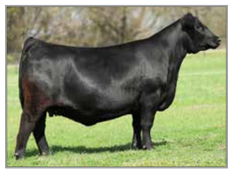
KCC FOREVER LADY 64G The late angus donor dam to lots 22\ \&\ 23