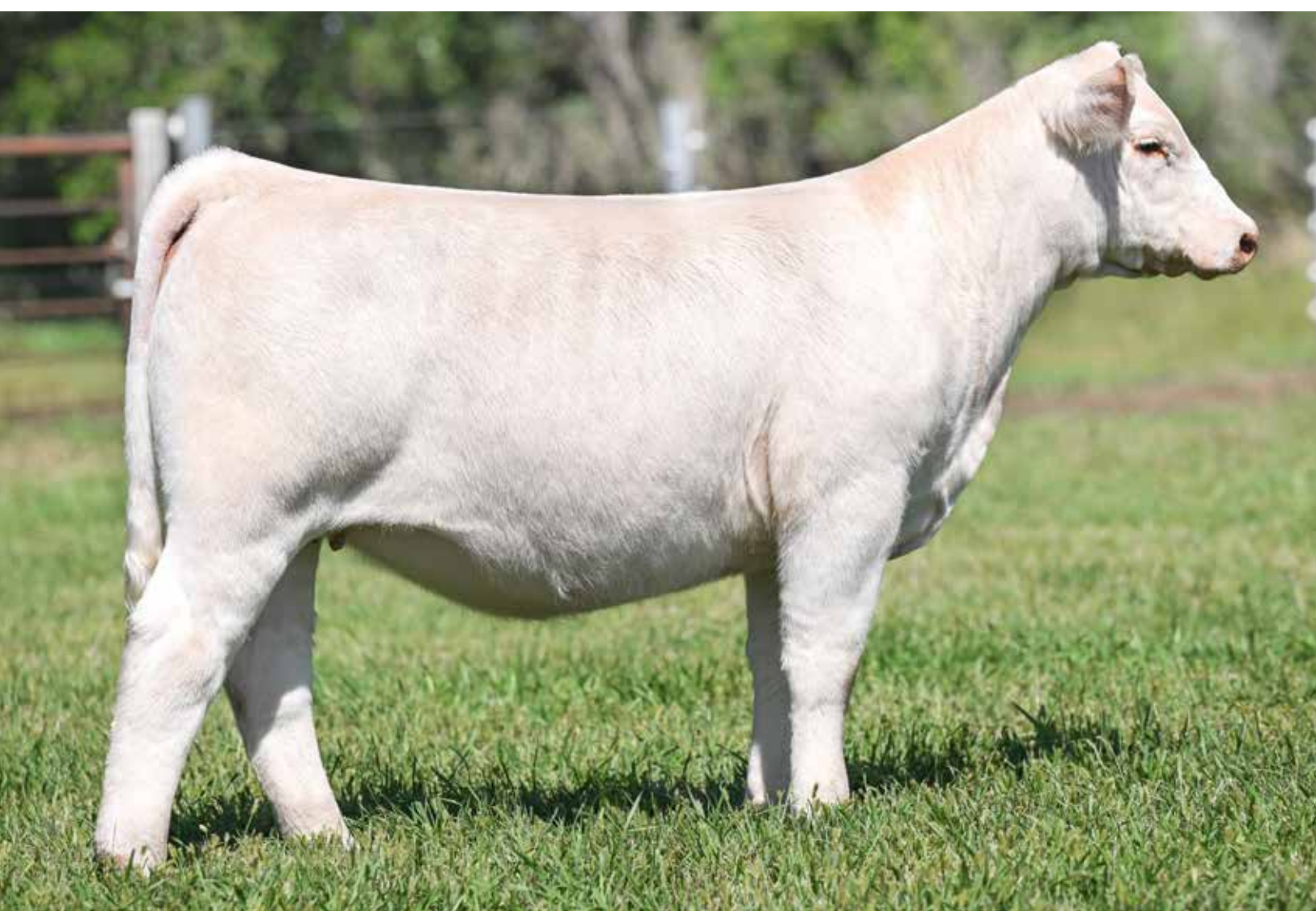
AC MS MADONNA 2418