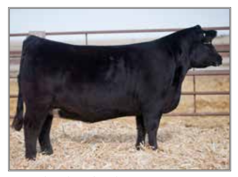
DUELLO BROKERS LUCY 4114 MATERNAL GRANDDAM OF LOT 64

WHF/JS/CCS Double Up insures that the basic fundamentals and body shape will remain consistent and true as one will find in this young breeding piece. Tried, true, and proven with multiple breed leading cow families to support the claim.