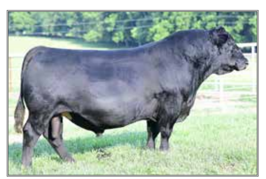
RP-BCR INSIGHT G302 SIRE OF LOT 4