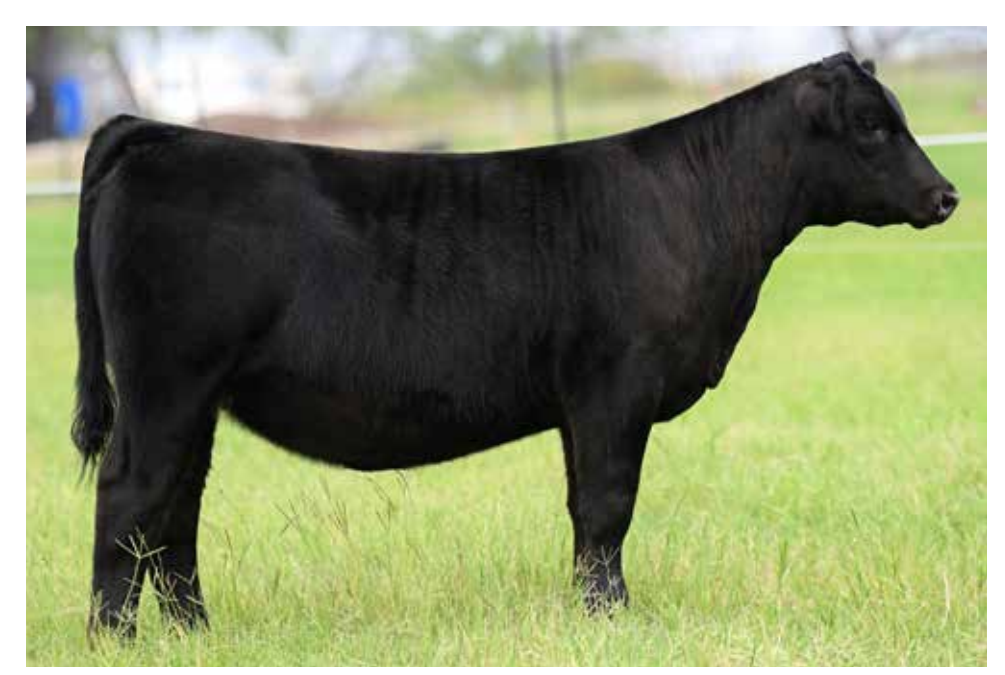
KCC1 MEMPHIS 4228 M

of The Black Label four maternal sisters to her dam commanded $35,000, $13,000, $12,000, and $8,000 to average right at $17,000. The maternal granddam KCC1 Estelle 510E gathered up a $30,000 price tag as a heifer calf and went on to be a Top 20 Finisher in the owned Purebred show of the 2018 AJSA Classic in Minnesota. "510E" had fourteen sons in the 2023 Kearns Cattle Company Bull sale that averaged just over $9,000 with a top of $28,000 selected by Hadden Simmentals of Castana, lowa. A stout-hipped, big-ended, huge-bodied female that is flawless in motion. She too is extended and centerfold like about her front third as well. She is the right kind with the right cow family to support her.