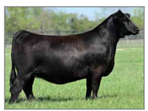
MMS CARLY 204H FULL SISTER TO LOT 37 PURCHASED BY HADDEN SIMMENTAL

A full sister to lot 38 was the high-selling bred female in the 2021 Black Label, MMS Carly 204H was the selection of Hadden Simmental of lowa. Little sister will not disappoint!