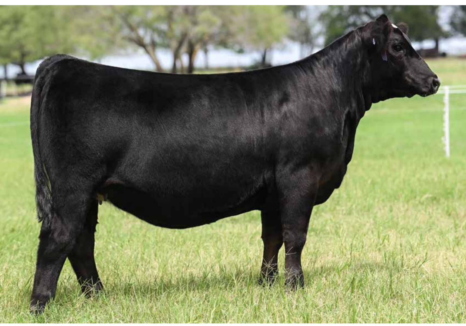
C GFR WICKED LASS 9 O