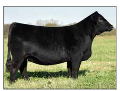
WLF SHEZ IT CO56 MATERNAL GRANDDAM OF LOT 14