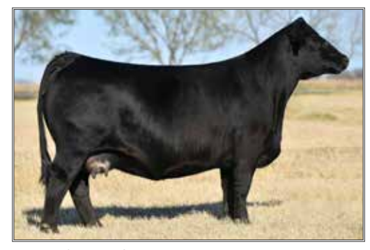
NFF WICKED B125 DONOR DAM TO LOT 39-42

This mating has been tried and true for many years. Females from this genetic combination have sold from $4,250 to $20,000. Some have went on to be competitive show heifers and others have certainly proved their worth In the pasture.