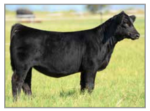
NFFS GISELLE 022G MATERNAL SISTER TO LOT 33