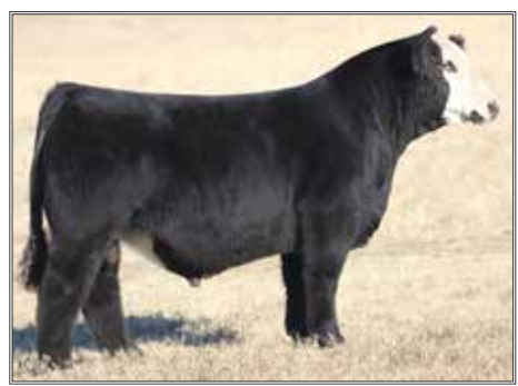
RJ TRUST FUND 212K SIRE OF LOT 9