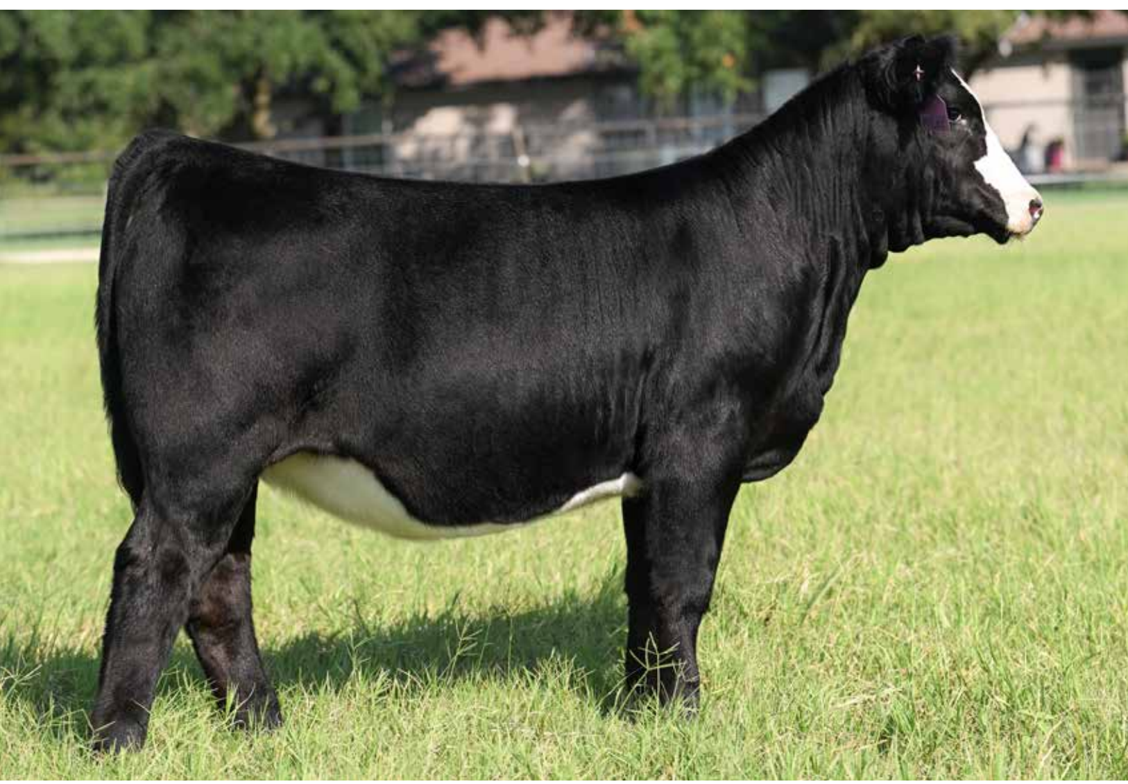
NFFS MAGNOLIA 463 M