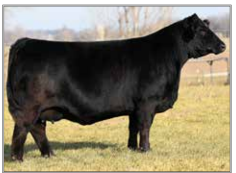
W/C ANGEL 2870Z FULL SISTER TO THE MATERNAL GRANDDAM OF LOT 36

This female from Sheffield Ranch offers a lot of the necessary parts and pieces to mature into a very competitive yearling and bred female. She is just a pinch green and fresh with nothing but time on her side. We like that youthful genuine look she maintains and believe that to be to her advantage. She is so chiseled and refined through her extended front third and blends smoothly out of her blade into her appropriate rib design. Her length and levelness of spine and hip is notable with a very ideal set and travel to her hock and rear pastern.