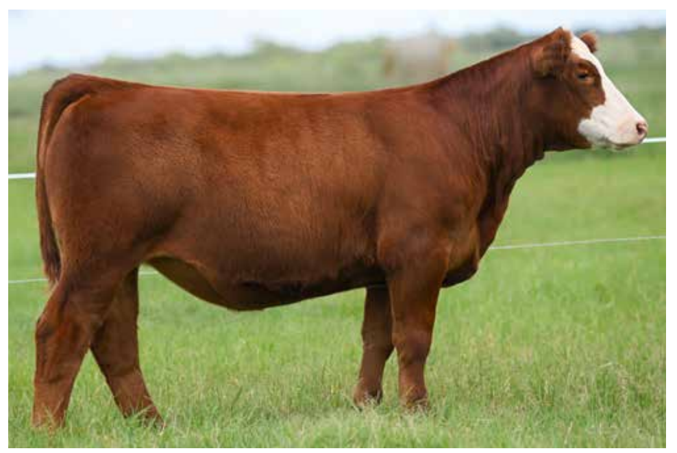
BAR O MAD MADAM 156 M OFFERED BY: BAR O CATTLE & SHIPWRECK CATTLE

Here is the only other opportunity on a redheaded female and the final opportunity on a daughter of W/C Red Bird 269J in this offering. WLE Shez It C056, this heifer's maternal