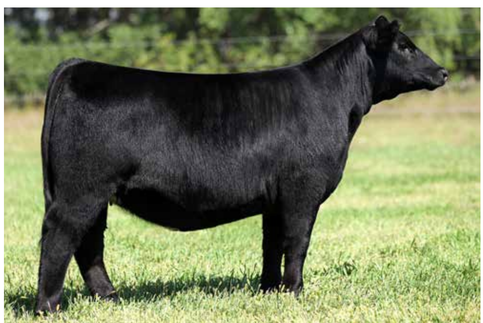
JSUL FANCY REBA 4207M OFFERED BY: ANDERSON CATTLE

amounts of presence and confidence, she is so flexible in her spine, and in the joints that flex to help her meet the ground with her big feet and bone work. She too has an abundance of rib shape and fills a big outline with her powerful body shape. There is no doubt that she is the eye-catching kind that will always get a look. Down the road, we believe her generating potential is as dynamic and versatile as perhaps any in this catalog, whether she be utilized in an upgrading program towards creating purebreds with an intriguing look, or club calf production, we truly think she has the aptitude and credentials to excel either way.