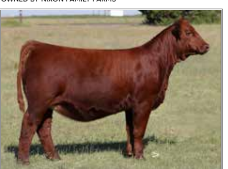
JCBB DREAM KIARA KOO2 DAUGHTER OF LOT 51 $39,000 2022 BLACK LABEL HIGH SELLING OPEN FEMALE