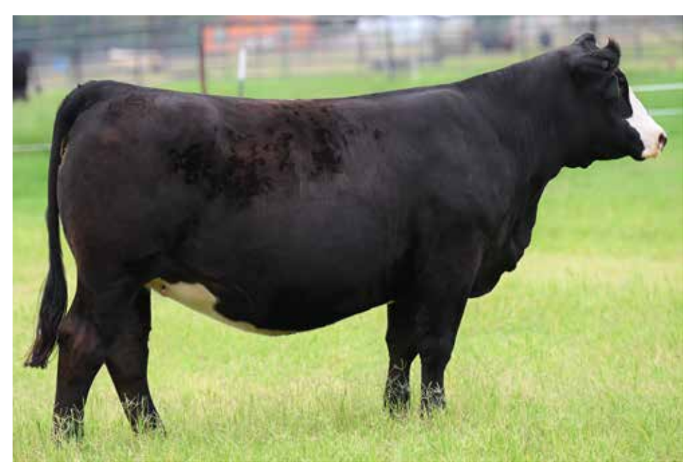
LICKITY SPLIT OFFERED BY: SHEFFIELD RANCH

A.I. BRED 6/3/24 TO WHF/JS/CCS/DOUBLE UP G365 (ASA#3658592) WITH AN EXPECTED CALVING DATE OF MARCH 12, 2025.