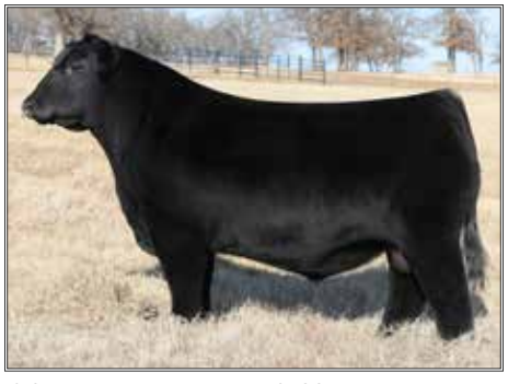
CONLEY LEAD THE WAY 0738 SIRE OF LOT 5