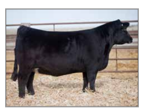
DUELLO BROKERS LUCY 4114 DECEASED DONOR DAM OF LOT 15