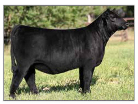
AHIN A-C LADY A 2302L $17,500 MATERNAL SISTER TO LOT 24 OWNED BY RILEY BETH PURVIS