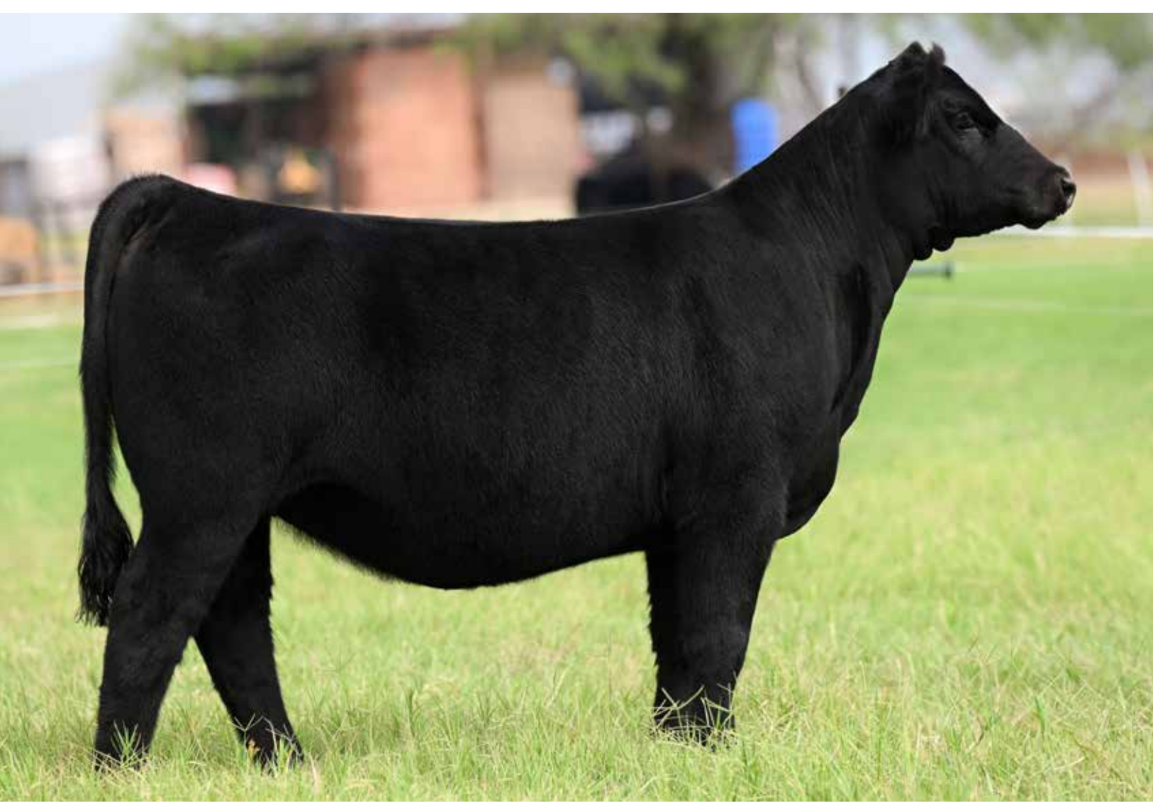
SR MARLEY 404M OFFERED BY: SHEFFIELD RANCH