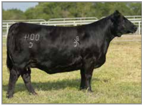
JSSC CAROLINA 004C DAM OF LOT 37