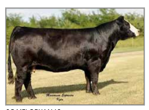
3C MELODY M668 MATERNAL GREAT GRANDDAM OF LOT 66

She is from the tried and true combination of MR HOC Broker and WS Pilgrim H182U with the influence of the late Wager and CK foundation matriarch, 3C Melody M668 BZ.