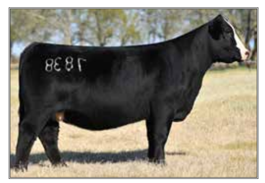
SANDEEN LADY 7838 FULL SISTER TO THE DAM OF LOT 34

CE BW WW YW MILK API TI 13.8 0.5 72.5 106.7 13.6 123.0 76.4