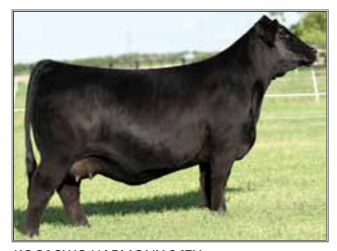
KCC1 SWC HARMONY 847H DAM OF LOTS 1-4