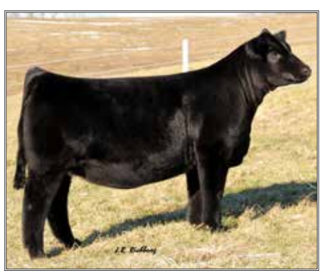
SC BEYOND BELIEF C21 DONOR DAM OF LOTS 59 AND 60

A.I. BRED ON 4/3/24 TO ZTGC JUST CUZ 52K (ASA# 4063644) WITH AN EXPECTED CALVING DATE OF JANUARY 10,2025.