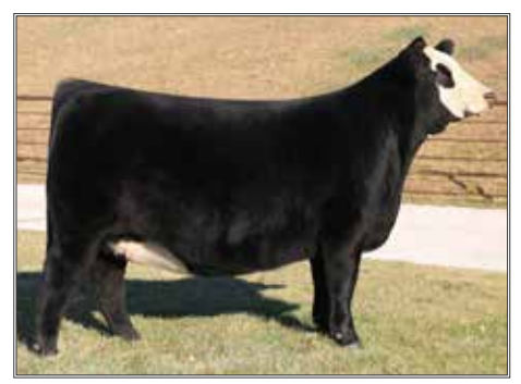
JBSF PROUD MARY DAM OF LOT 10 & MATERNAL GRANDDAM OF LOTS 11 & 12

The influences JBSF Proud Mary have been spread wide throughout the Simmental breed and while she remains one of the most decorated show heifers in recent history, it is her achievements as a producer that carry the candle and will inevitably be her shining glory. It would be difficult to debate against the fact that her most recognizable offspring to date would be the JSUL Something About Mary 8421 sire that has maintained a stranglehold on the high sellers and champions lists of the past several sale and show seasons. Lot 10 would be a full sister to the deceased SAM sire, a bull who remains one of the Simmental breeds and show heifer business's go to sire options. While you can let your imagination run wild as to the marketability and generating opportunities that adding this female to your breeding program would allow, it takes no guesswork in the short term to realize her ability to garner attention as a show heifer prospect. She is absolutely killer to look at, and seldom will you find her not striking a pose, we too think that she is much more than a pretty silhouette as she is built with more power, width, and substance than you typically find in one built this attractive from the profile.