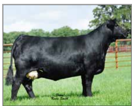
RP/MP BUILT TO LOVE A021 LEGENDARY PATERNAL GRANDDAM OF LOT 4