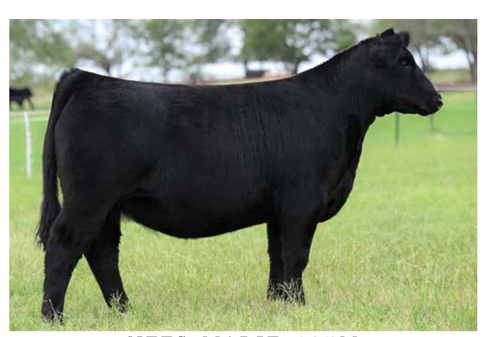
FS MARIE 405 M OFFERED BY: NIXON FAMILY FARMS NFFS

This Next Level daughter is a descendant of the prolific and profitable TR MS Katinka 3208N. 3208N would be the foundation donor dam that lines many of the Angus pedigrees in the Thomas Ranch Angus program of Harrold, South Dakota. She is the dam of