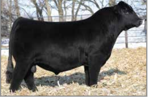
SO REMEDY 7F SIRE OF LOT 3

CE BW WW YW MILK API TI 15.0 -0.3 76.5 120.4 20.1 131.9 78.5