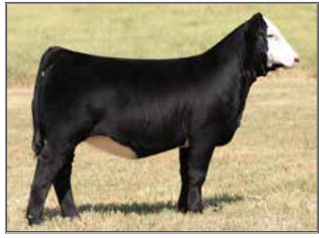
JCBB DREAM TIARA 122J DAUGHTER OF LOT 51