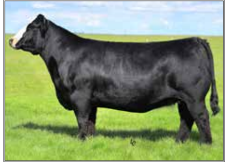
KCC1 HAVANA 83F DAM OF LOT 5 & MATERNAL GRANDDAM OF LOTS 1-4

Lot 5 is the only direct daughter of the KCC1 Havana 83E matriarch in the 2024 Black Label and she happens to be the only individual sired by the 2023 17th Annual Embryos on Snow Oklahoma City Edition $460,000 half-interest Conley Lead The Way 0738. It's no secret in the industry what success the cattle by "Lead The Way" are experiencing in the sale setting or on the tanbark. They have certainly been met with dollar signs and admiration wherever they may roam. In the Black Label, it's definitely known that the cattle from this donor dam surface to the top in terms of shear quality and shape.