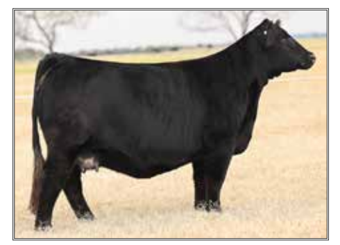
JS FLIRT A WAY 76H