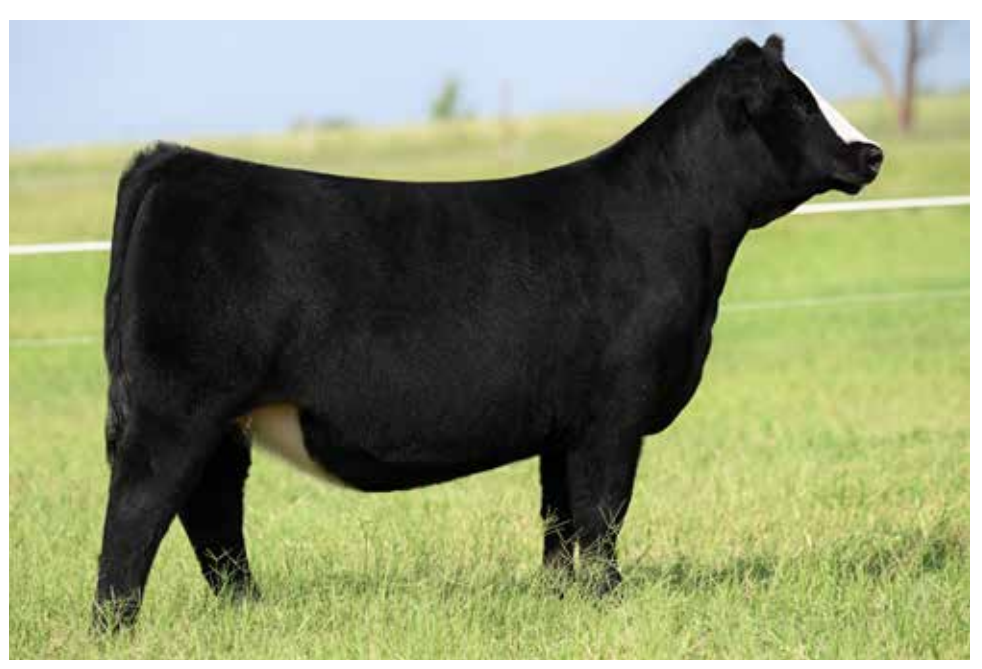
L JR FOREVER MAIDE I MAIDEN

A blaze faced SimAngus female from the Shipwreck Cattle and Jackson Cattle Angus donor dam, KCC Forever Lady 64G who is now deceased and sired by the sire of champions for Boyert Show Cattle and Buck Creek Ranch, Next Level.