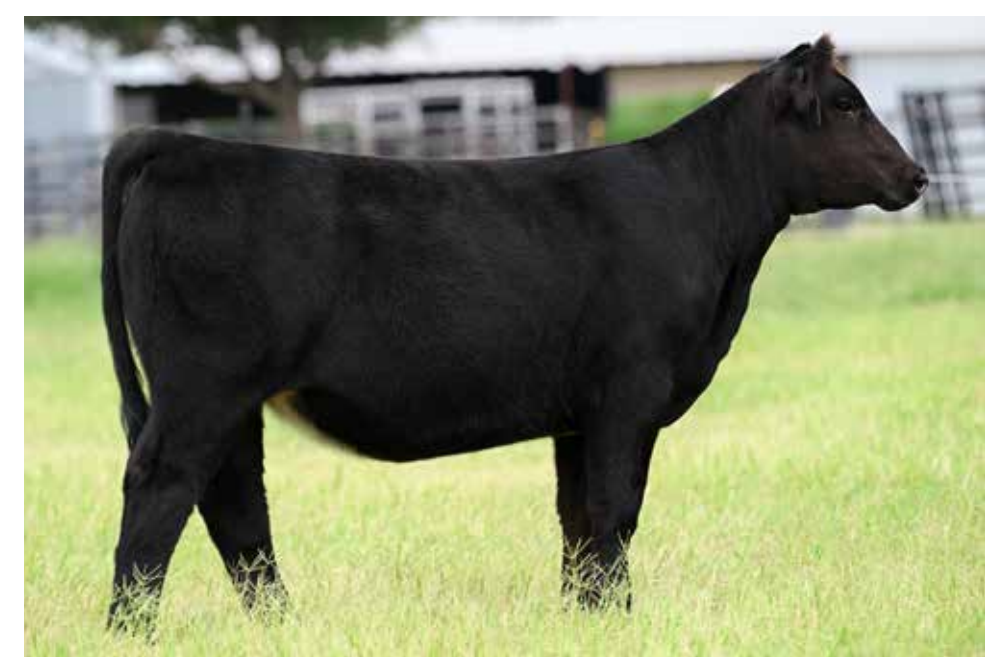
\underset{\mathsf{OFFERED}}{MILEY}\,\, 412\,\, M

A youthful daughter of SO Remedy 7F who descends back to a full sister to the past National Champion W/C Angel 2870Z with the influence of the sire known in this sale offering as JSSC Wide Body 090W. She should pack quite a punch when it's said and done from a production stand point.