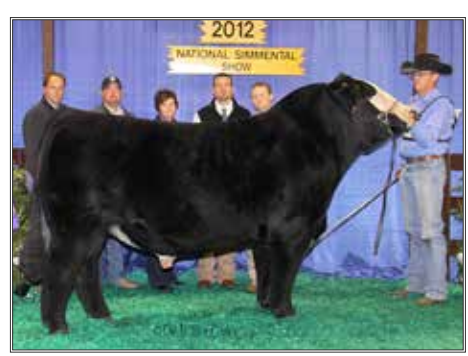
MR HOC BROKER FULL BROTHER TO THE DAM OF LOT 28

We expect this female sired by STCC Tecumseh 058J to be stouter in shape and bone than the sisters who proceeded her. She is certainly longer and more extended to this point and comes with the same great look and balance the family is known for.