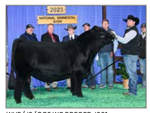
WHF/JS/CCS WOODFORD J001 2023 NAILE GRAND CHAMPION PERCENTAGE SIMMENTAL BULL SIRE OF LOTS 1 & 2