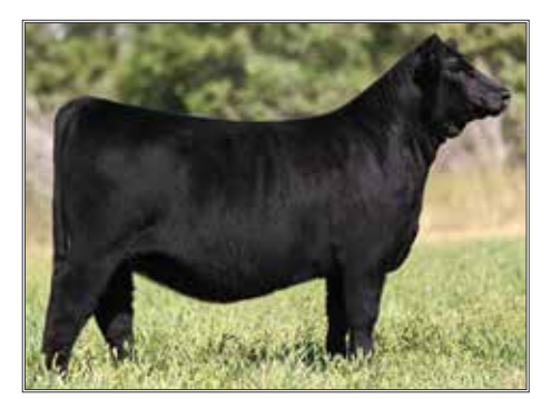
JSUL A-C SWC OH BOY REBA 3102L FULL SISTER TO LOTS 16 & 17