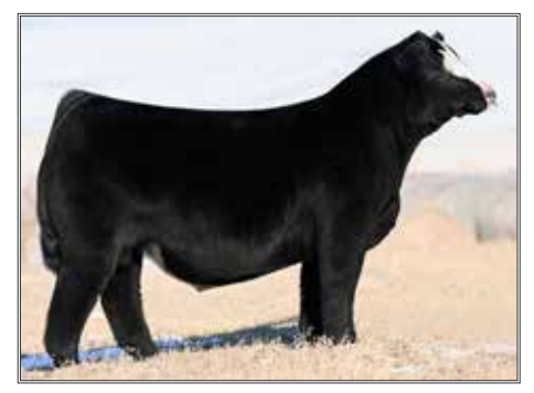
NEXT LEVEL SIRE OF LOTS 21-26

In the 2023 edition of The Black Label a maternal sister by JBSF Berwick 41F, SWC LJR Lady Forever 264L, sold for $25,000 and we think that this pair is most definitely worthy of that consideration.