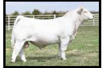
TR CAG CARBINE'S VISION 9700 ET SIRE OF LOTS 1-5