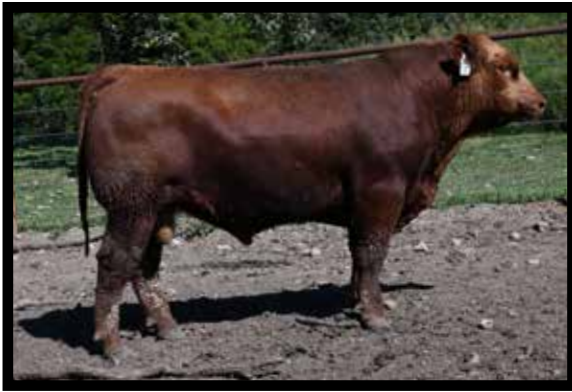
IBBC TMAS LEXUS 302L LOT 33