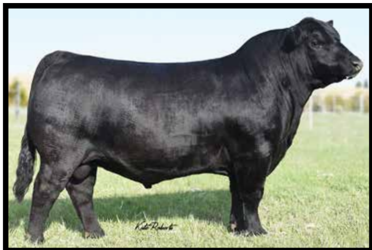
KR CASINO 6243 SIRE OF LOTS 101-105