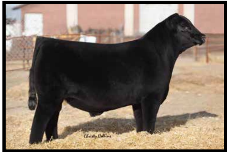
SILVEIRAS STYLE 9303 SIRE OF LOT 108