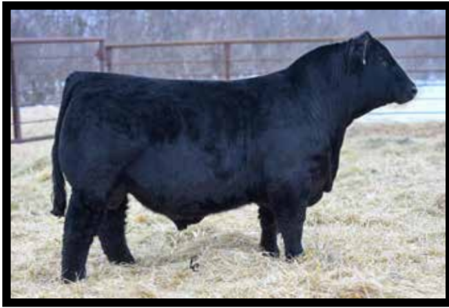
CDI TRUSTEE 387F SIRE OF LOT 49