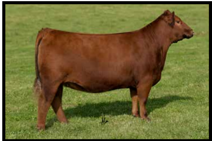
DAMAR OH ME BABY D031 DAM OF LOT 37