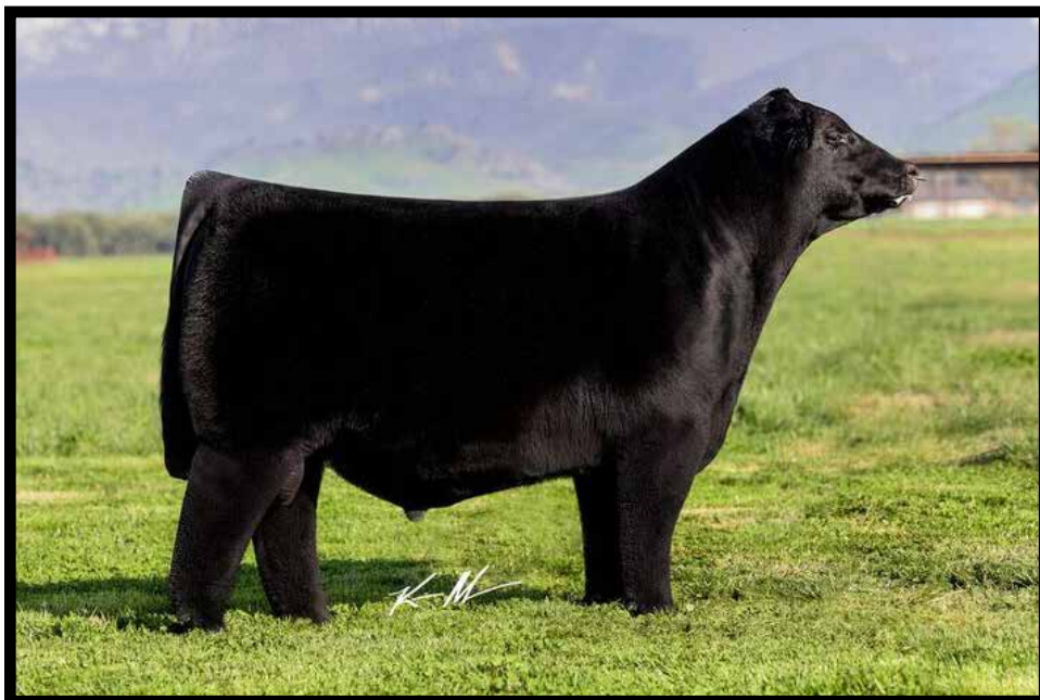
COLBURN PRIMO 5153 SIRE OF LOT 106