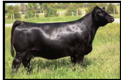
MISS WERNING KP 8543U MATERNAL GRANDDAM OF LOT 51