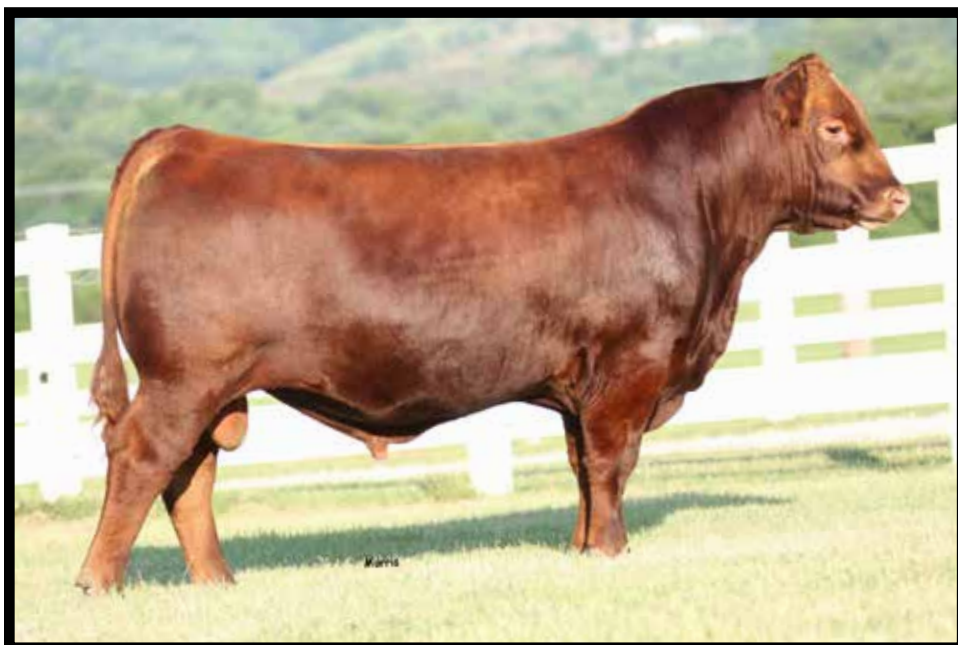
ERKS MULBERRY 9918 SIRE OF LOTS 30-32