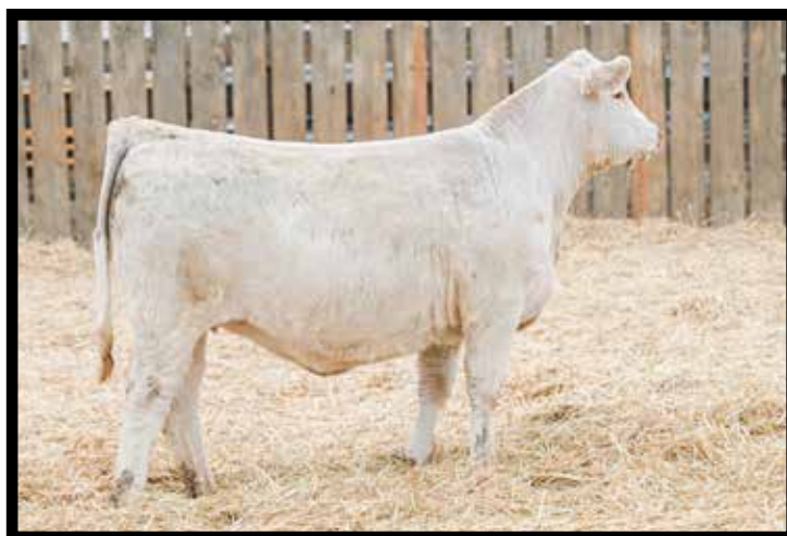
TR MS DAKOTA BOB 1623J DAM OF LOT 5