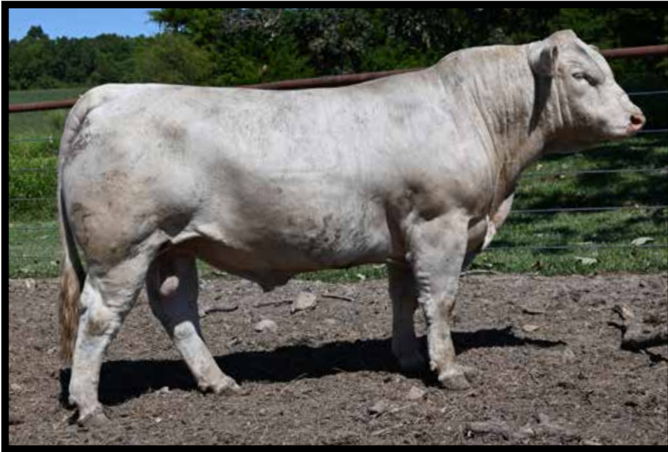
BC/HF MR VISION 305 LOT 1