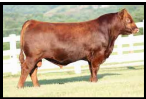
ERKS MULBERRY 9918 SIRE OF LOT 52