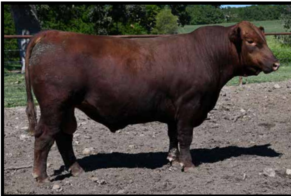
IBBC MR ROXY 341 LOT 24