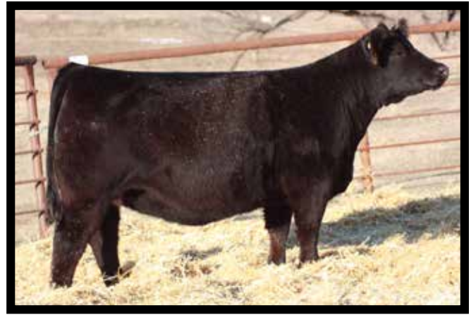
HARRELL ANGEL 5870C DAM OF LOTS 49 & 50