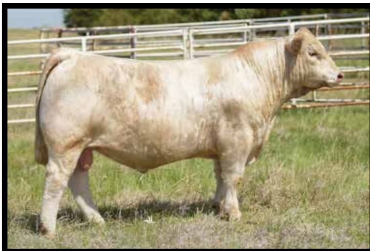
WDZ STRATEGY 811 P ET SIRE OF LOT 22