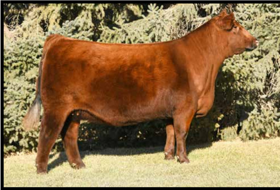
ROJAS NAVARRE 6054 DAM OF LOT 28