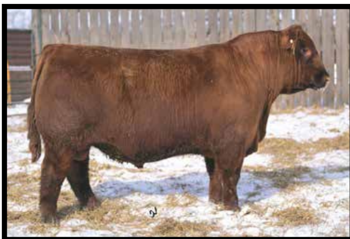
TMAS MR TRUMP 889F ET SIRE OF LOT 133