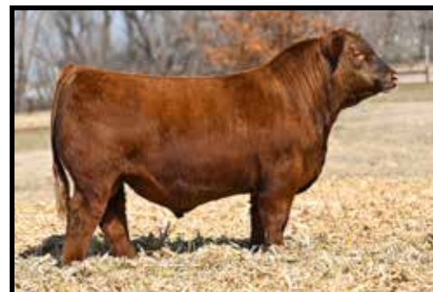
WEBR RED REVIVAL 78H SIRE OF LOT 44