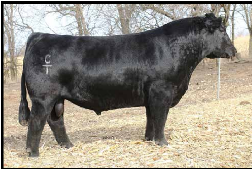
TJ HIGH CALIBRE 556B SIRE OF LOT 117

PE 4/17/24-5/13/24 TO BUSHES LIGHT (AAA: 20221550)