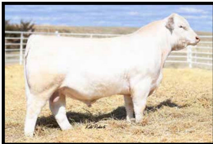
GHC REAGAN 9012 SIRE OF LOT 17