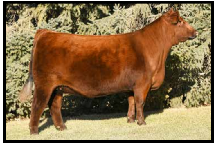
ROJAS NAVARRE 6054 DAM OF LOTS 36 & 39