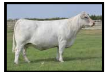
M&M MS CARBINE 1567 PLD PATERNAL GRANDDAM OF LOTS 1-5