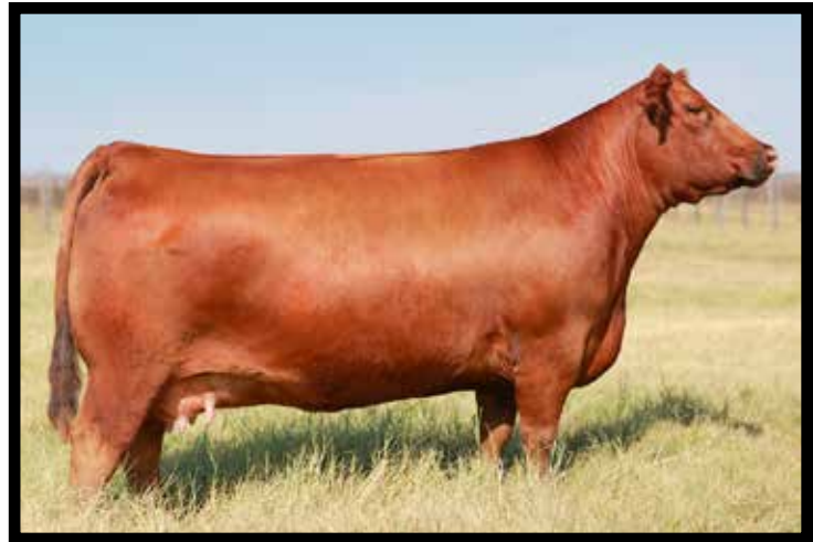
SIX MILE LAKOTA 112Y MATERNAL GRANDDAM OF LOT 36