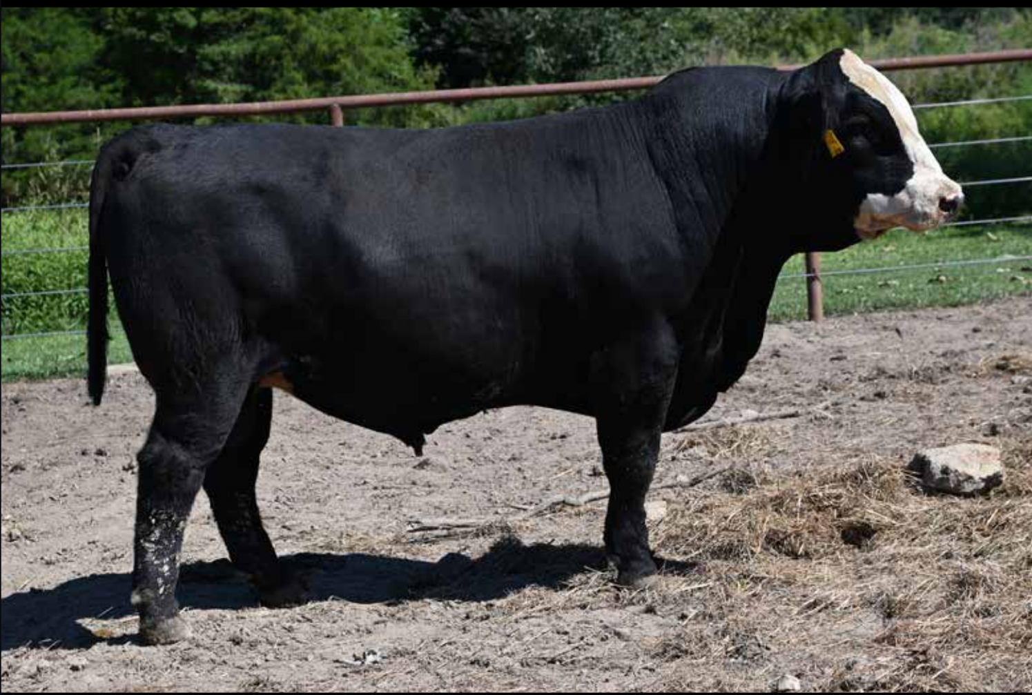
1BBC EDSL 327L LOT 46