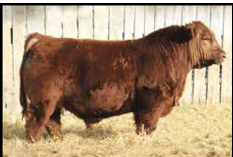
RED MRLA RESOURCE 137E SIRE OF LOT 42