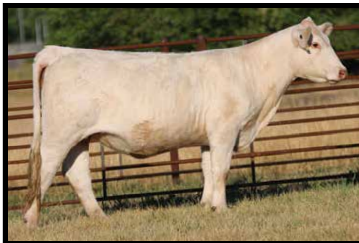
C&S MS HEMI 091 DAM OF LOT 4