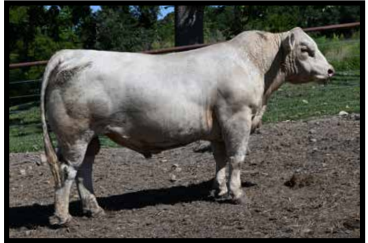
BC MR CARBON COPY 312 LOT 6

TR CAG CARBON COPY 7630E ET PATERNAL GRANDSIRE OF LOT 6