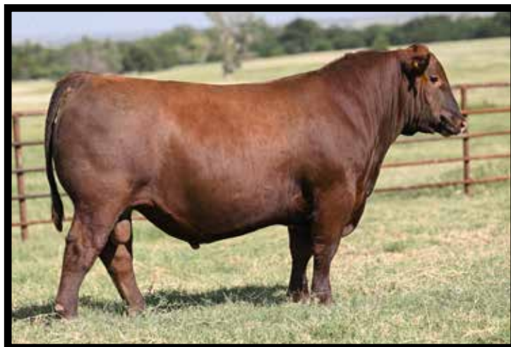
4MC KING OF THE COWBOYS 2112 SERVICE SIRE TO LOTS 111-115