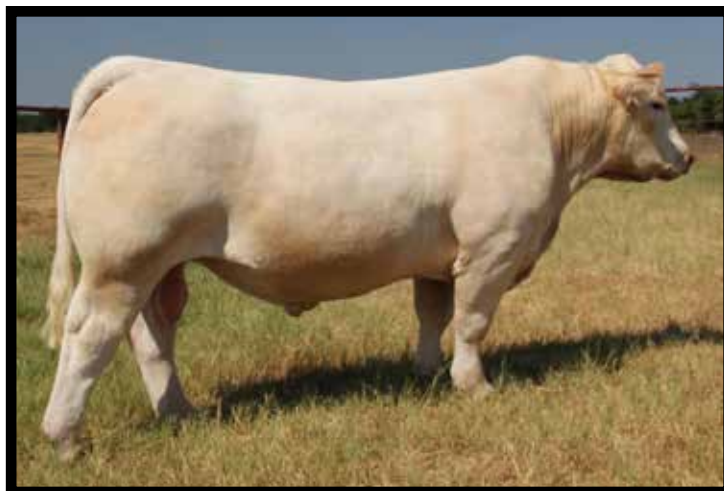
M6 BELLS & WHISTLES 258 P MATERNAL GRANDSIRE OF LOT 16