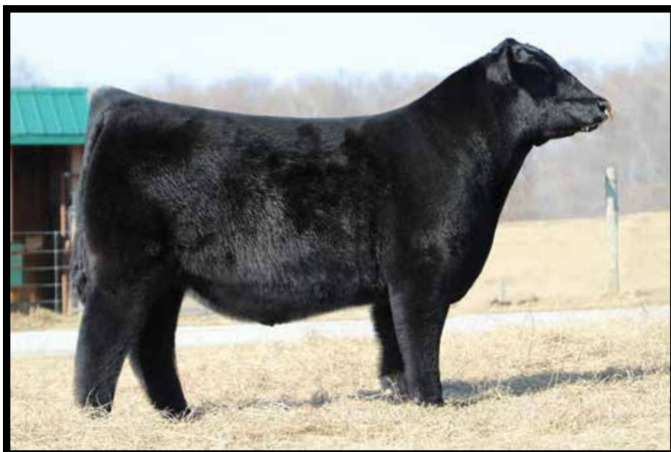
SCC SCH 24 KARAT 838 SIRE OF LOT 107

PE 4/17/24-5/13/24 TO BUSHES LIGHT (AAA: 20221550)