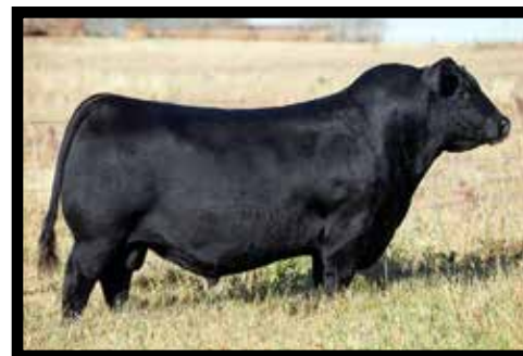
BROOKING BANK NOTE 4040 SIRE OF LOT 55