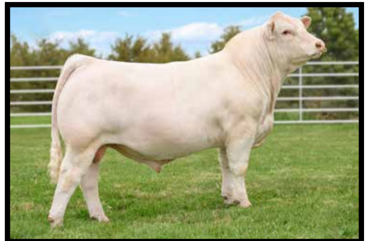
TR LEGACY 1707J MATERNAL BROTHER TO LOT 7

• Top 25% CED, top 30% BW, top 35% WW, MILK, top 40% YW.