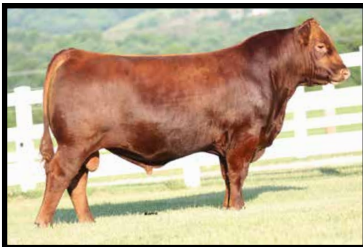
ERKS MULBERRY 9918 SIRE OF LOT 132