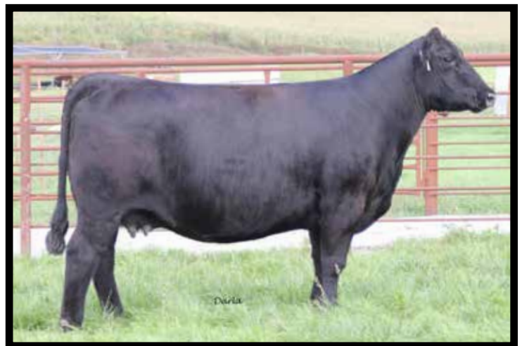
SULL STOCKMAN 7294 MATERNAL GRANDDAM OF LOT 110