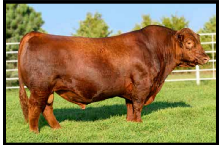
PIE QUARTERBACK 789 SIRE OF LOT 39