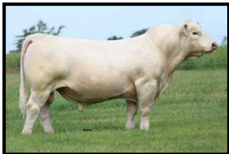
HF CHAVEZ 1915 P SIRE OF LOTS 14-16