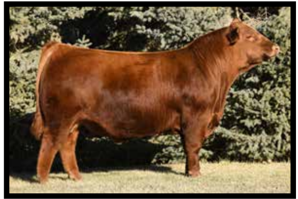
DAMAR NEXT D852 SIRE OF LOTS 33-35