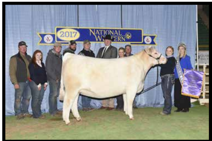
CAG GUARDIAN 555C PATERNAL GRANDDAM OF LOTS 10-13