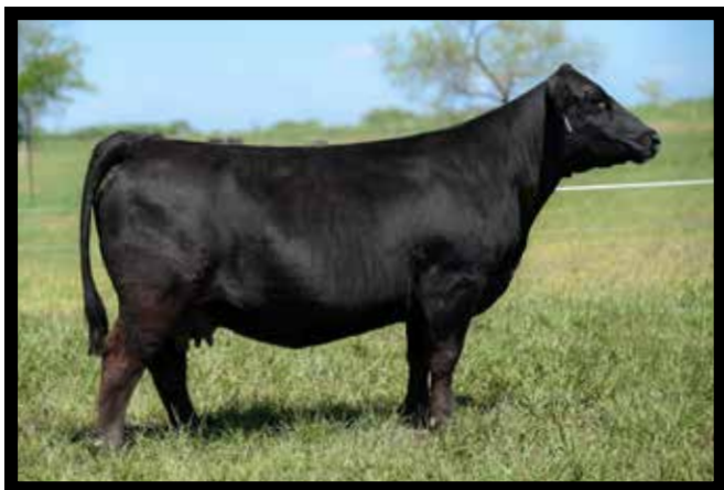
W/C SWC HARRELL ANGEL 99G DAM OF LOTS 47 & 48