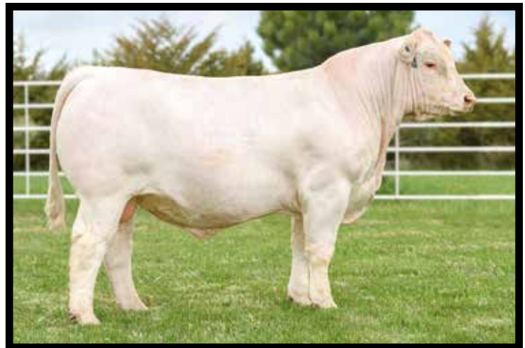
LT BADGE 1358 PLD SIRE OF LOT 122