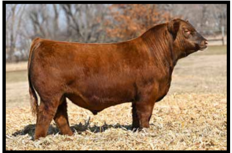
WEBR RED REVIVAL 78H SIRE OF LOTS 128 & 129