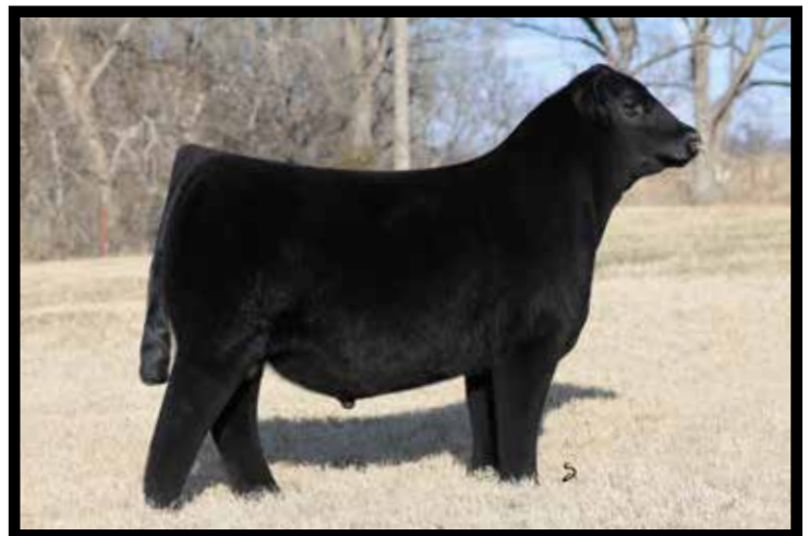
CONLEY NO LIMIT SIRE OF LOT 109