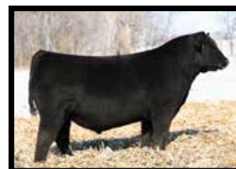
BUSHES LIGHT SERVICE SIRE TO MANY FEMALES THROUGHOUT THE OFFERING!