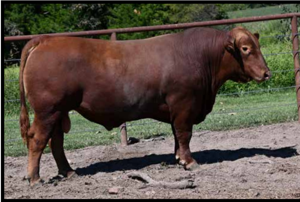
IBBC MR TRUE 339 LOT 23