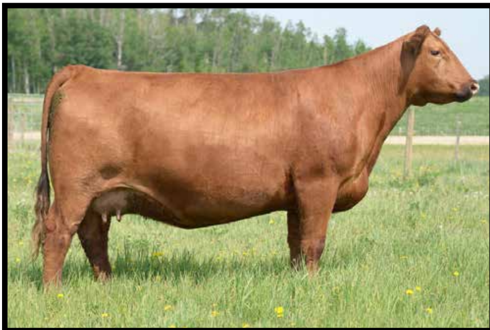
RED RAINBOW COUNTESS 32X DAM OF LOTS 29 & 30