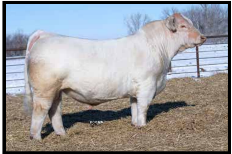
KEYS TROUBADOR 173J SIRE OF LOT 121