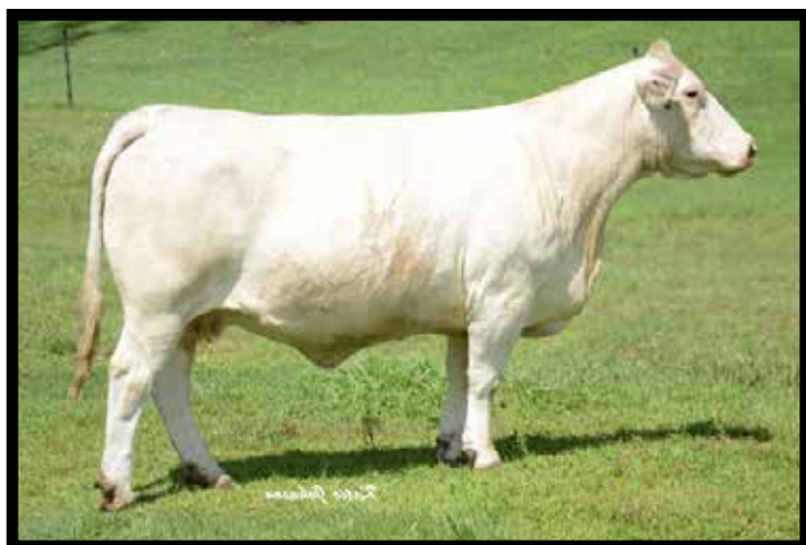
SULL IMPRESSIVE 0641-1 CLONE MATERNAL GRANDDAM OF LOT 19