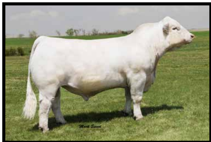
TR PZC MR TURTON 0794 ET MATERNAL GRANDSIRE OF LOT 15