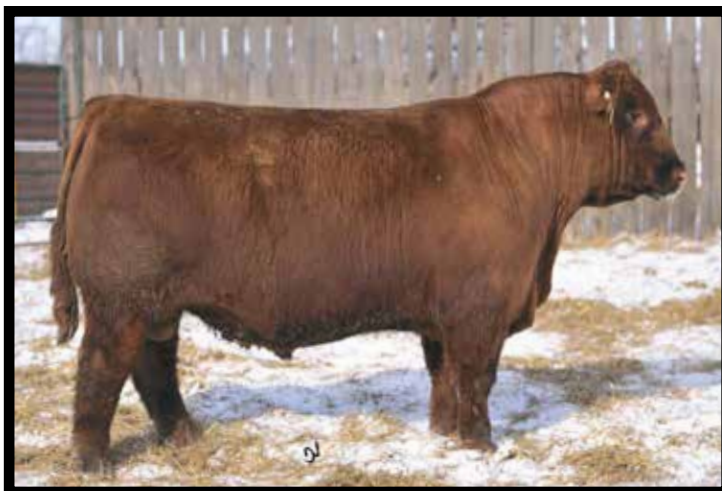
TMAS MR TRUMP 889F ET SIRE OF LOTS 23-27