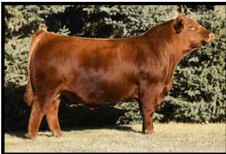
DAMAR NEXT D852 SIRE OF LOT 131