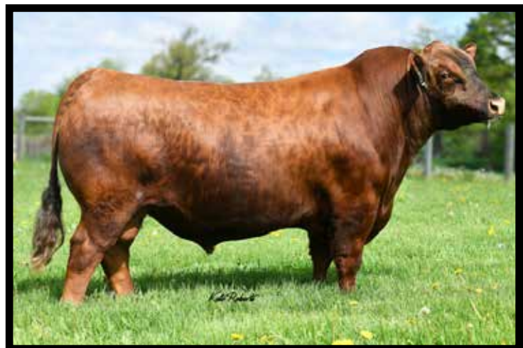
9 MILE FRANCHISE 6305 SIRE OF LOT 38