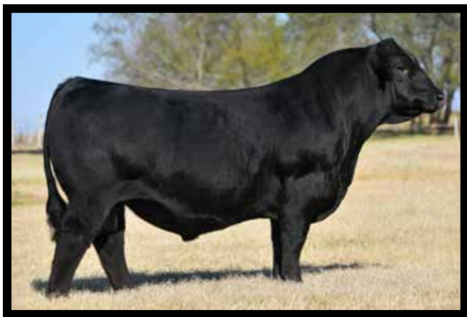
ES RIGHT TIME FA110-4 SIRE OF LOT 47