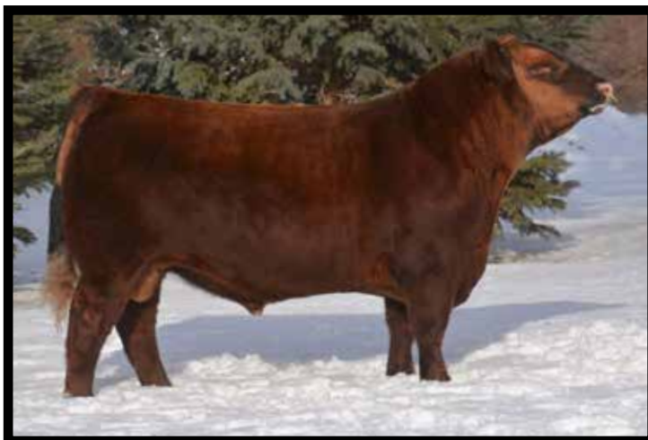
DAMAR TRUMP C512 PATERNAL GRANDSIRE OF LOTS 23-27