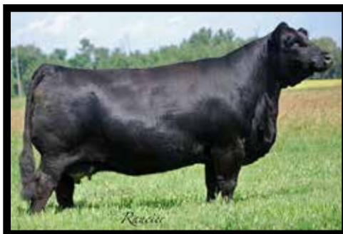
RF CERTAINLY FLIRTIN 202Z DAM OF LOT 54