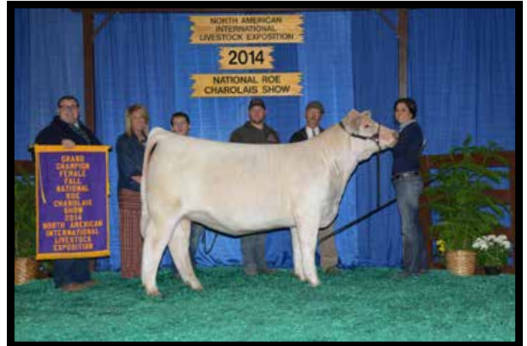
TR MS KAY 30A ET DAM OF LOT 7