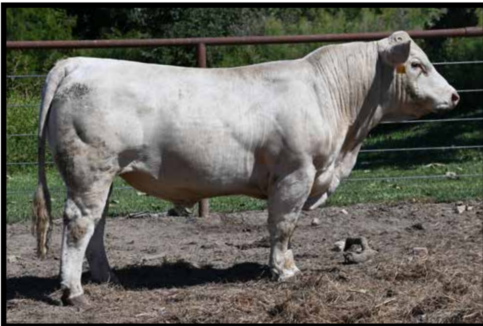
BC MR VISION 2319 LOT 2