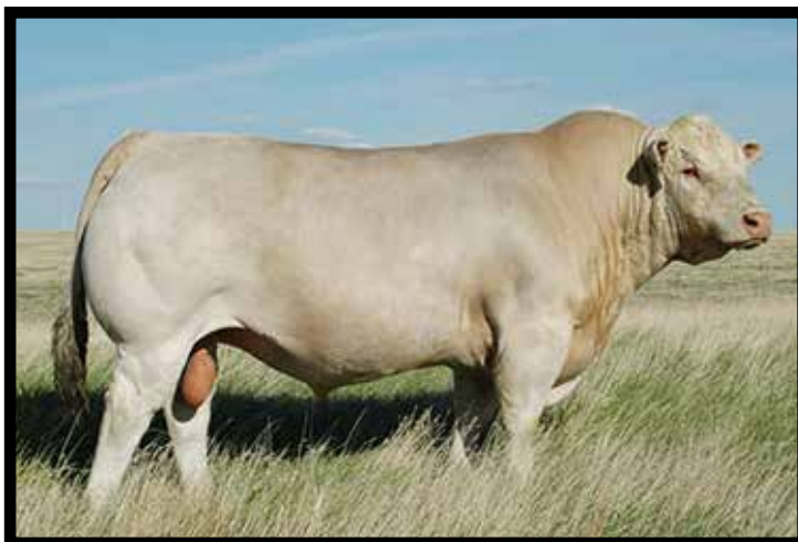
LT LEDGER 0332 P MATERNAL GRANDSIRE OF LOT 21