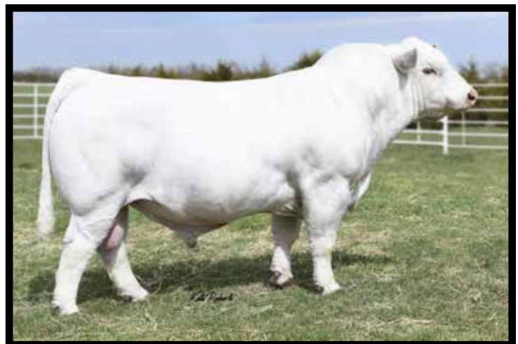
M&M OUTSIDER 4003 PLD PATERNAL GRANDSIRE OF LOTS 123, 124, & 127