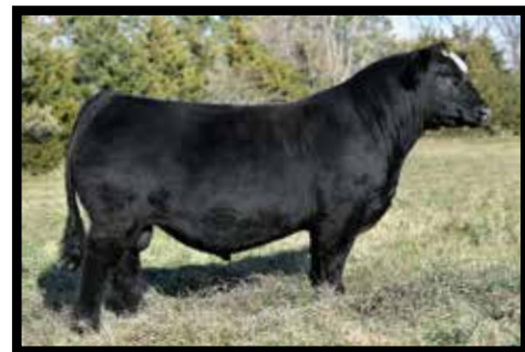
W/C FORT KNOX 609F SIRE OF LOT 51