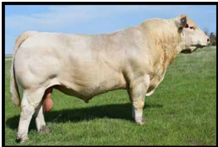
LT PATRIOT 4004 PLD SIRE OF LOT 19