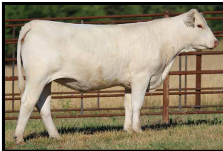
BC MISS BRENDA 2103 DAM OF LOT 3