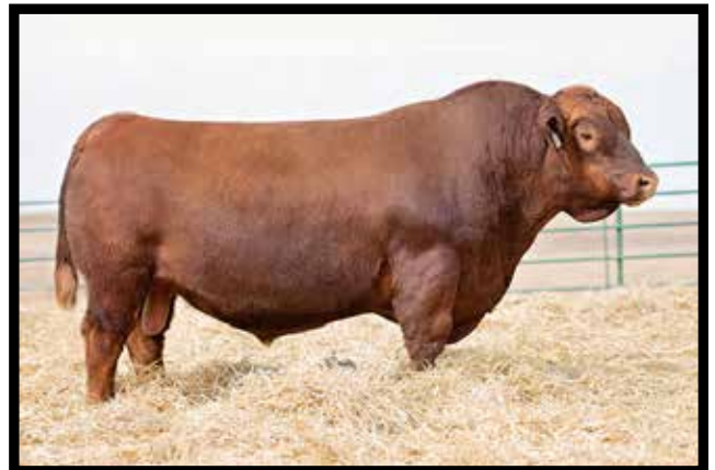
CDI MAVERICK 335B PATERNAL GRANDSIRE OF LOT 46