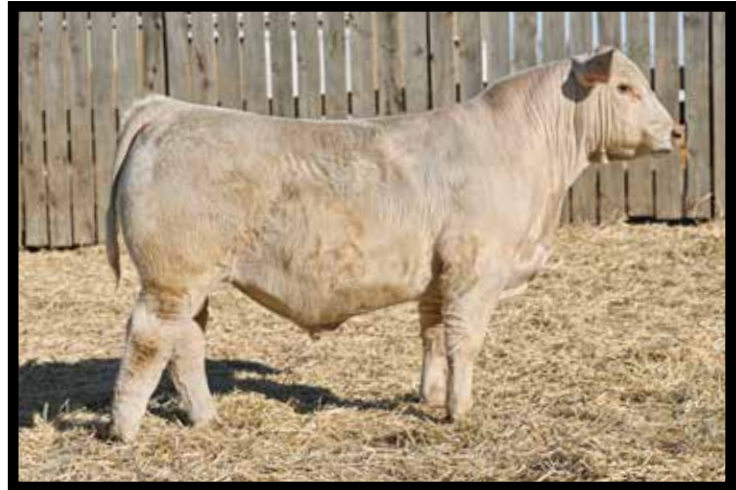
CAG MR SIDELINE 0816H ET SIRE OF LOTS 10-13