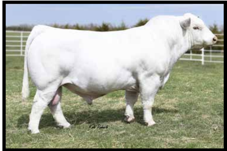
M&M OUTSIDER 4003 PLD SIRE OF LOTS 7-9