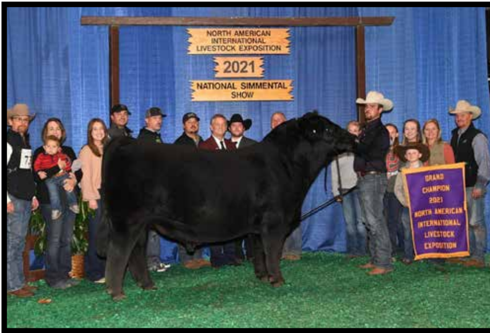
ROCKING P PRIVATE STOCK H010 SIRE OF LOT 116