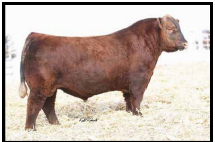
PIE FULLBACK 7005 SIRE OF LOT 130