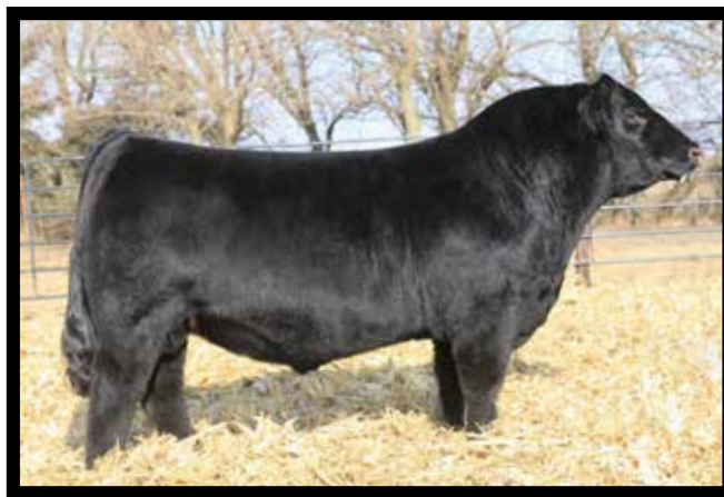
EC REBEL 156F SIRE OF LOT 48