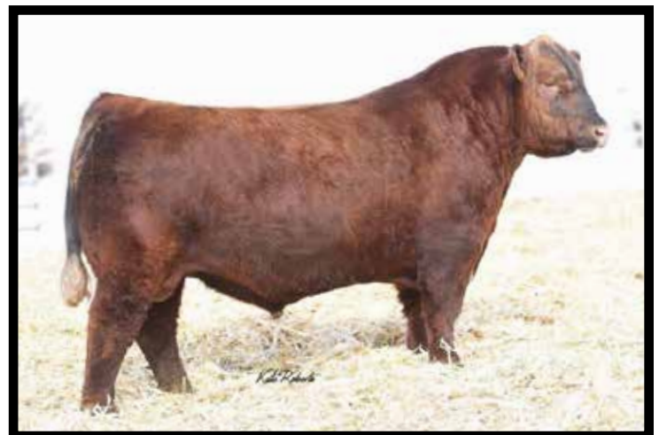
PIE FULLBACK 7005 SIRE OF LOTS 40 & 41