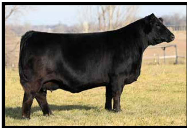
W/C MISS ANGEL 2870Z MATERNAL GRANDDAM OF LOTS 47-50