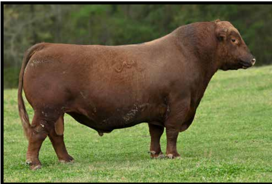
4MC KING OF THE COWBOYS 706 SIRE OF LOTS 28 & 29