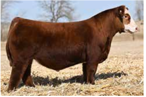
W/C BET ON RED 481H - Sire of Lots 19 and 20

330D is a big, powerful, heavy female that comes with elephant-sized feet, huge bone, deep and big in her body shape with a huge upper hip and a big caboose. The mating to W/C Bet On Red only accents all of her dominating highlights with an extra shot of style and class. We think this female is extremely versatile and she offers breeding and marketing flexibility as well. Continue the tradition and mate her Simmental or break rank and see what she can do for making club calves or the high end crossbred females that surface in the supreme lineups on the tanbark.