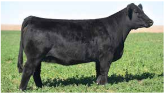
TKCC VICTORIA 57A - Maternal Granddam of Lot 24

Shipwreck Cattle Company & Kearns Cattle Company