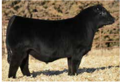
FRKG CKCC PLATINUM 009H - Sire of Lot 14

0)ffered by: 16.0 109.0 71.7 Shipwreck Cattle Company