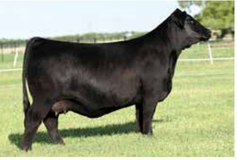
KCC1 SWC HARMONY 847H - Maternal sister to lots 34 and 35

SAFE TO 3BCC KASH MONEY L21 (ASA# 4337048) WITH P.E. DATES OF 11/30 TO 12/10/23. ESTIMATED DUE DATE OF 9/8/24