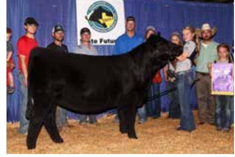
FLY SHEEZA TX LADY 8015C - Dam of Lot 14