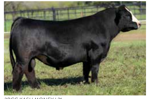
3BCC KASH MONEY L21 Service Sire of Shipwreck Cattle Company Bred Heifers