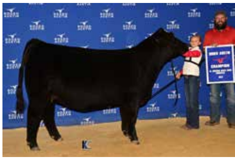
KCC1 SWC HEAVENLY 26H - Dam of Lot 11

This youthful fall prospect has made several friends this winter and spring. She comes with the extra body shape that wasn't native to her dam but enhanced by her sire. She is the near-perfect genetic and phenotypic blend as all areas of weakness on both sides were complemented and strengthened by the other. She maintains her dam's seamless and smooth silhouette and hits the surface with flex and integrity. This one has a very bright future and comes with an awesome, problem-free disposition.