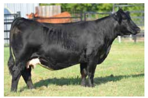
SWC HOC ANNIE K 214C - Dam of Lot 38

614K is a definite breeding piece, the kind to build a program around just as we have done with her dam and maternal granddam. The predictability of kind and the return that these females offer is reliable and will keep an outfit in business for the years ahead. Another excellent female who carries the exclusive service of 3BCC KCC1 Krypton 100K. This is the ONLY sale offering in 2024 that has his service on the block for investment consideration.