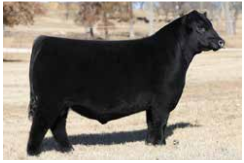
CONLEY VERIFIED 0853 - Sire of Lot 42

Just imagine the potential return on investment that is on board!