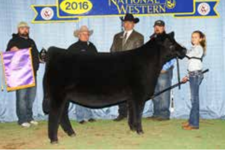
DAF REBA C85 - Dam of Lot 37 and Maternal Granddam of Lot 36

SAFE A.I.TO 3BCC KCC1 KRYPTON 100K (ASA# 4142616) ON 11/11/23 WITH AN EXTIMATED CALVING DATE OF 8/20/24.