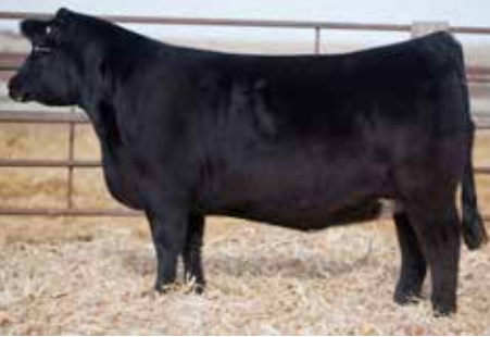
DUELLO BROKERS LUCY 4114 - Donor dam of Lot 33