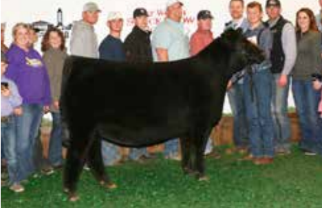
KCC FOREVER LADY 64G - Dam of lot 41