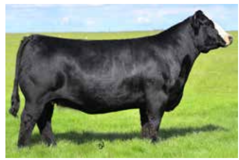
KCC1 HAVANA 83E - Donor Dam of Lots 34 and 35