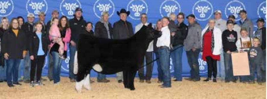
2024 OYE Reserve Supreme Champion Breeding Heifer - Dam is a Maternal Sister to Lot 31

Shipwreck Cattle Company & 1 Eleven Cattle