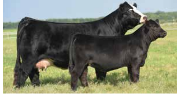
WAGR CHANEL 5073C - Maternal Granddam of Lot 20