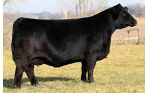
W/C MISS ANGEL 2870Z - Maternal Granddam of Lot 12