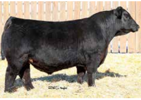
BRIDLE BIT RECHARGE K256 - Service Sire of Lots 42 and 43

SAFE A.I. TO BRIDLE BIT RECHARGE K256 (ASA# 4058272) ON 11/11/23 WITH AN ESTIMATED CALVING DATE OF 8/20/24