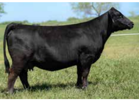
W/C SWC HARRELL ANGEL 99G - Dam of Lot 12

()ffered by: 16.1 127.6 79.4 Shipwreck Cattle Company and Rust Mountain View Farms