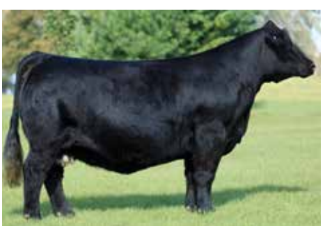
JS FLIRT A-WAY 59Y - Maternal Granddam of Lot 13