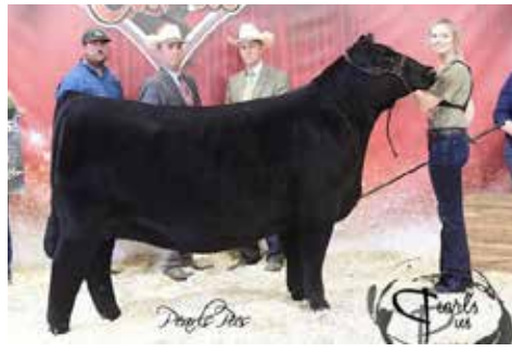
JSUL REBA'S FANCY 8375F - Dam of Lot 36