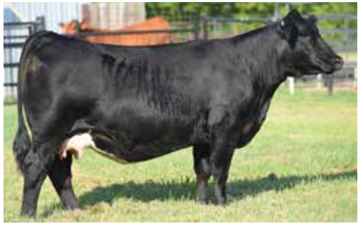
SWC HOC ANNIE K 214C - Donor Dam of Lots 6-8