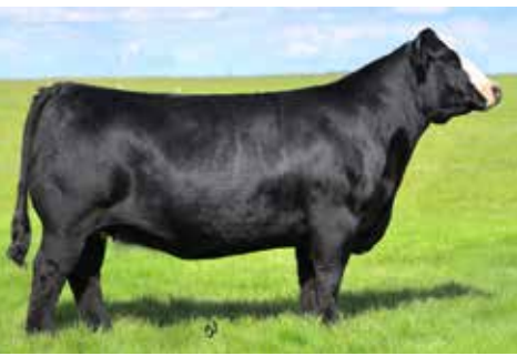
KCC1 HAVANA 83E - Maternal Granddam of Lot 11