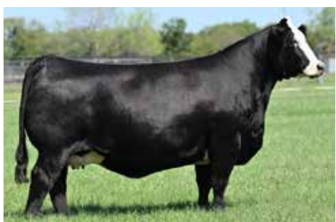
SWC DYLAN K 330D - Donor Dam of Lot 19