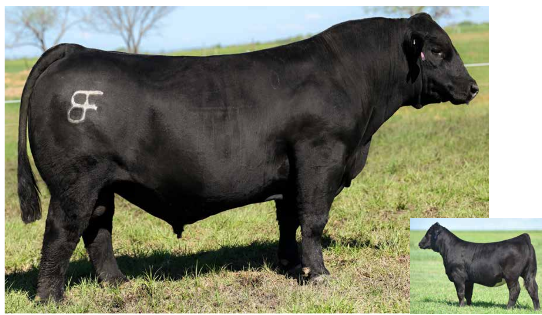
FBFS EXCLAMTION 045E - $75,000 Dam of FBFS SWC Jordan 23J