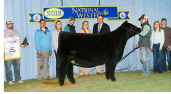
PEINE/GS ROSIE 677D - Donor Dam of Lot 10