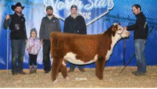
KGB LOGIC KAYE 8613 - Full Sister to Lot 26

Shipwreck Cattle Company & Blagg Herefords