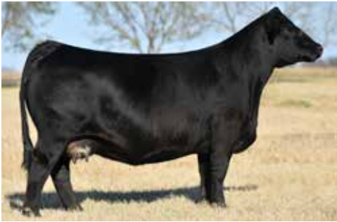
NFF WICKED B125 - Donor Dam of Lots 1-3