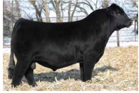
SO REMEDY 7F - Sire of Lot 39