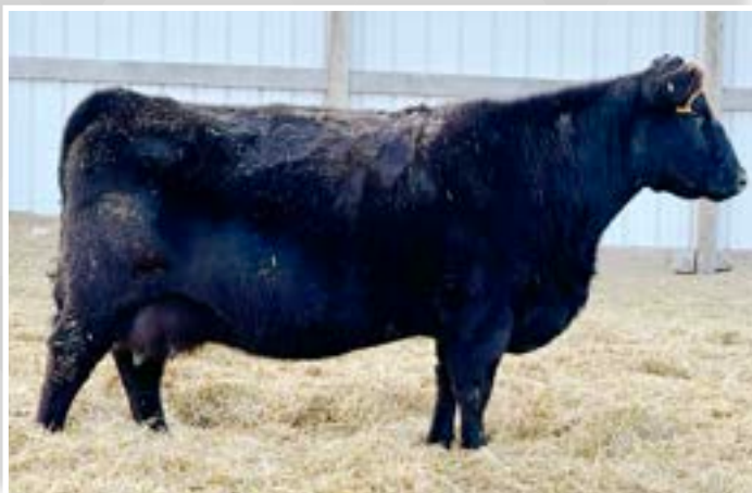
L83 BLACK DARLA 636D MATERNAL GRANDDAM