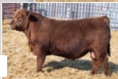
L83 KOLT 38K BROTHER