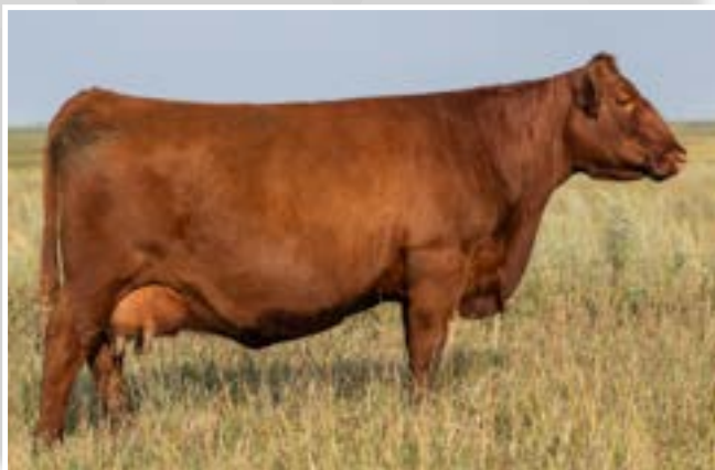
JK MARGO MATERNAL SISTER

Again in 2024 the Geyer family has supplied the goods with a group of herd bull prospects that will provide ranchers with extreme quality both from a phenotype and pedigree standpoint. Yet JK Laramie stands out from the pack as being one of the most elite they have raised to date. Regardless of where your selection criteria begins you will find quality here, he is a bull, out of a first calf heifer, that embodies beef bull characteristic, with impressive muscle shape, explosive stifle design, impeccable foot structure and added length of spine, he is one that is sure to add real world quality and genuine beef production advantages. Numerically he elevates his position to the front of the offering for his ability to massively increase weaning weight, yearling weight, average daily gains and carcass weight. His real-world data affirms the science, as he recorded 108 ratios for both weaning and yearling weights.