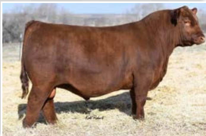
RED U2 TOWNSHIP 17G SIRE