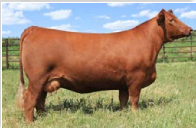
SLGN SHEBA'S CHARLI MATERNAL GRANDDAM

A direct son of RED MRLA Resource 137E that conforms to the reason why the sire group has become so popular nationwide. He is a deep sided, dense built beast that has been impressive from early on. We think his progeny will exceed the median in terms of performance and phenotypically they are going to be burly and big featured. A high performing SLGN Bojangles 479B daughter forms the base for JK Larado.