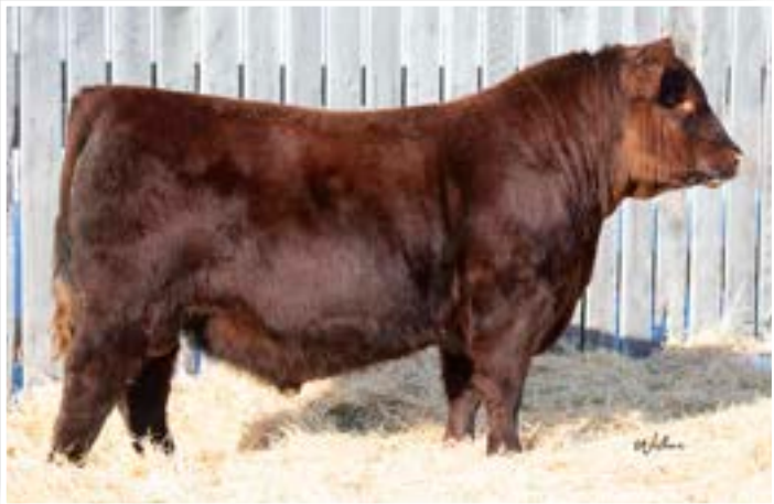
RED WILBAR INTUITION 832J SIRE TO LOTS 1 - 5