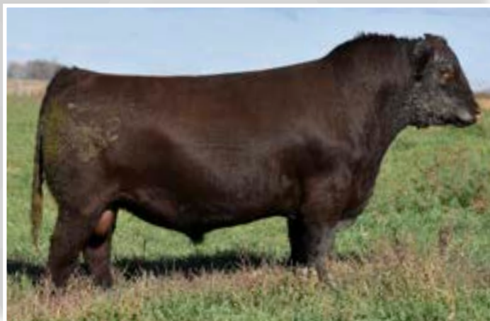
SMOKY Y OZARK 9131G SIRE TO LOTS 25 - 27