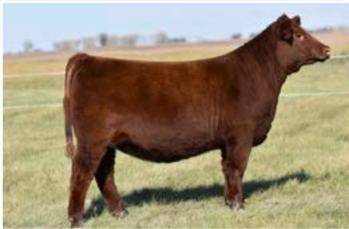
L83 JOSI 130J MATERNAL SISTER