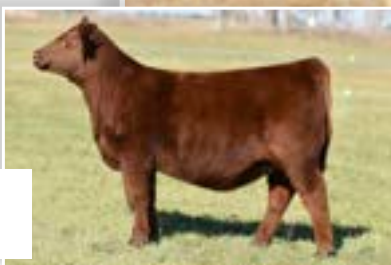
MATERNAL BROTHER TO DAM OF L83 LARKANA 350L