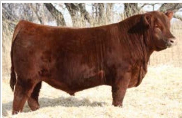
SIX MILE MOSSY OAK 175H SIRE

Even though he sports some of the most elite performance numbers, Lone Oak 1L is still one of the leading calving ease options you will find selling, March 26 th . If you appreciate cattle that come light and easily, but still mature with extra mass, shape and density then pay attention to this early maturing son of Six Mile Mossy Oak 175H. Here we have the cowboys delight, the kind of sire that adds versatility and options for those that need a herd bull that can be trusted during calving season, but still sires cattle that weigh heavy come market time. He is the oldest bull in the offering, and will be ready to see cows shortly after sale day.