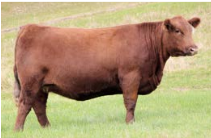
LRL HEIDI J52 DAM