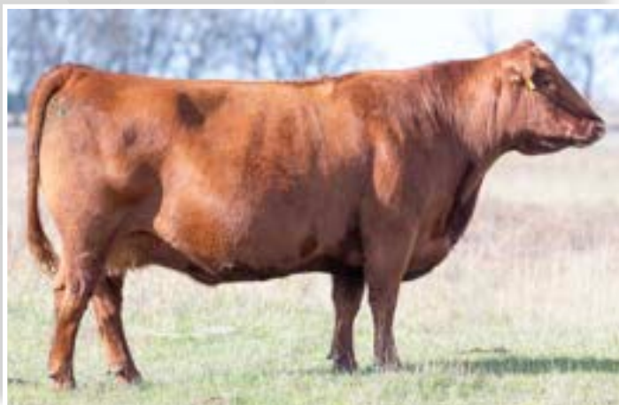
L83 MINOLA 731E DAM

Here we have a prime example of curve bending genetics, this lead off Wheel Stark 67G son entered the world with a 72 lb. birthweight but impressively flipped to a 715 lb. weaning weight, and he never took his foot off the gas as he accelerated towards 1223 lbs. at a year to record a 102 YWR. Trace his pedigree and you will find that his quality comes by no fluke as he is a maternal brother to L83 Hamlet 9H who sold to Twedt Red Angus. He records very acceptable CED, and BW figures, along with his top 13% WW and top 18% YW numbers. His ability to add long term cowherd profitability is reflected by his top 28% HB index.