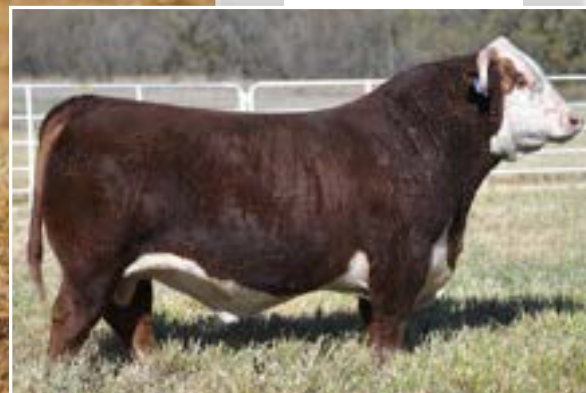
DF HECTOR 19H SIRE

The second DF Hector 19H son is the extra heavy weaning, L Hector 25L. Some would call him the most robust ribbed, deepest sided of the brothers, and he came with the advantage of 30 more pounds to the weaning pen. His dam is a daughter of the Haroldson's Upgrade T100 33D sire that has been heavy use in the nation's most progressive Hereford operations. Here we have a real world bull with the genetic versatility to add value to progeny that will work for a variety of operations with differing marketing programs or management strategies.