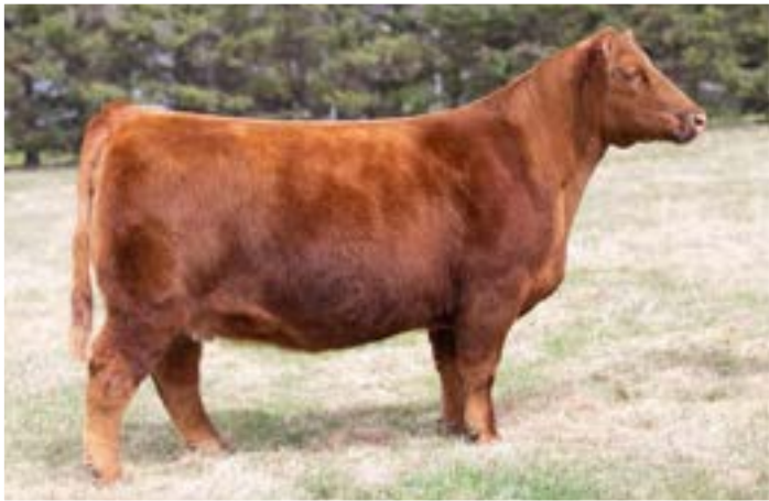
WEBR MS ELLIE 1024 MATERNAL GRAND DAM