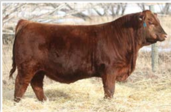
SIX MILE JOLT 452J SIRE TO LOTS 6 - 18