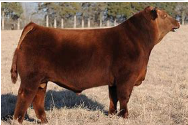
RED SOO LINE POWER EYE 161X SIRE