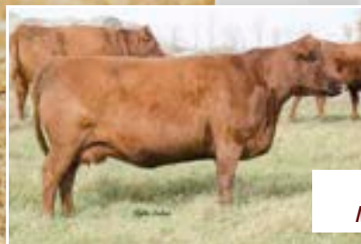
L83 MISS BRONTE 021 MATERNAL GRANDDAM

The second son of L83 Jagger 7J is long sided and big scaled. He stems from a young Red T-K Raptor 26E daughter from the Bronte cow family that originated in the Messmer program. If you're looking to add some extension and eye appeal without making compromises to the easy keeping ability of your calf crop then 7J becomes as a very logical option. His replacement heifer daughters will be in demand!