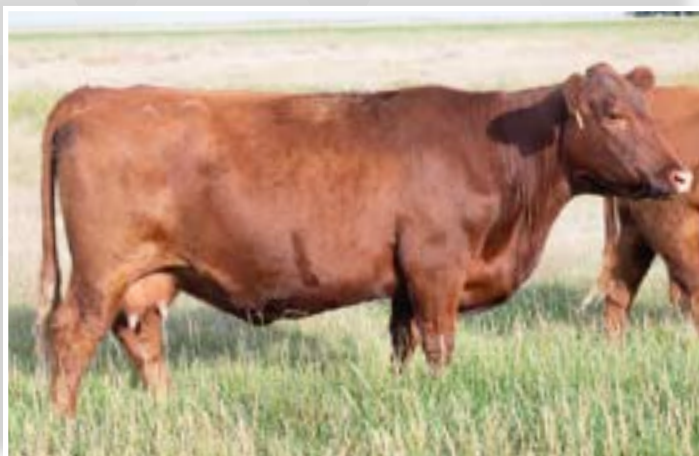
WSM GINNIE 975G DAM

The Six Mile GSF Jolt 452J sons are powerful! We look forward to hearing from happy customers when the progeny of his sons hit the scales and prove the hype we have around them. Not only do they have performance but they more than surpass the strict structural checklist each bull goes through before making the sale pen, they combine power cattle with productivity. L83 Voltage 18L is supported with growth traits ranking in the upper echelon of the breed that include top 8% WW, top 5% YW and top 5% ADG. He stems from a young female that we purchased from Wasem Red Angus that is already proving to be worth the chips.