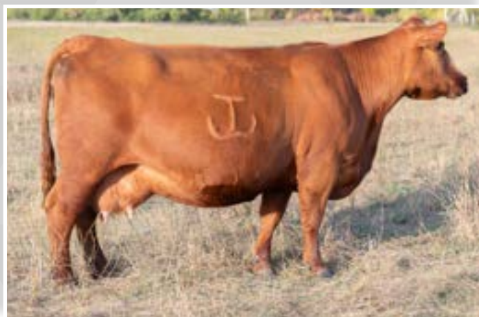
L83 BINDY 122B DAM