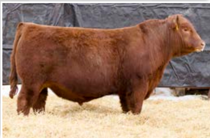
L83 HAMLET 9H SOLD TO TWEDT RED ANGUS - MCHENRY, ND