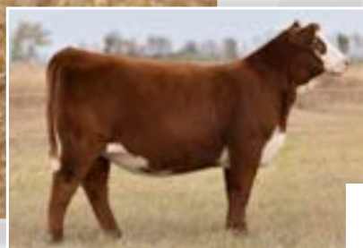
L83 KODA 248K FULL SISTER

The hereford offering is built upon two ultra-stout, impressively masculine sons of our resident herd bull DF Hector 19H. L Hector 27L is a full brother to the L Koda 248K female from the 2022 Female Sale, and if you remember her, then you will realize the quality is reliable as these two are cut front he same mold being massively dense, built wide at their base and still motor with added flexibility and candor. This athletic and proud headed beast is set to sire an awesome set of baldy faced, premium bound feeder cattle or replacement females.