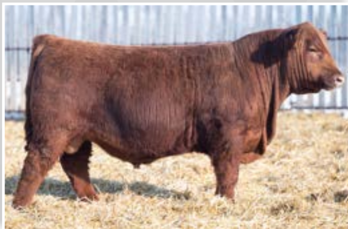
L83 KRUSH 39K SOLD TO NICK MATHERN - EDGELEY, ND