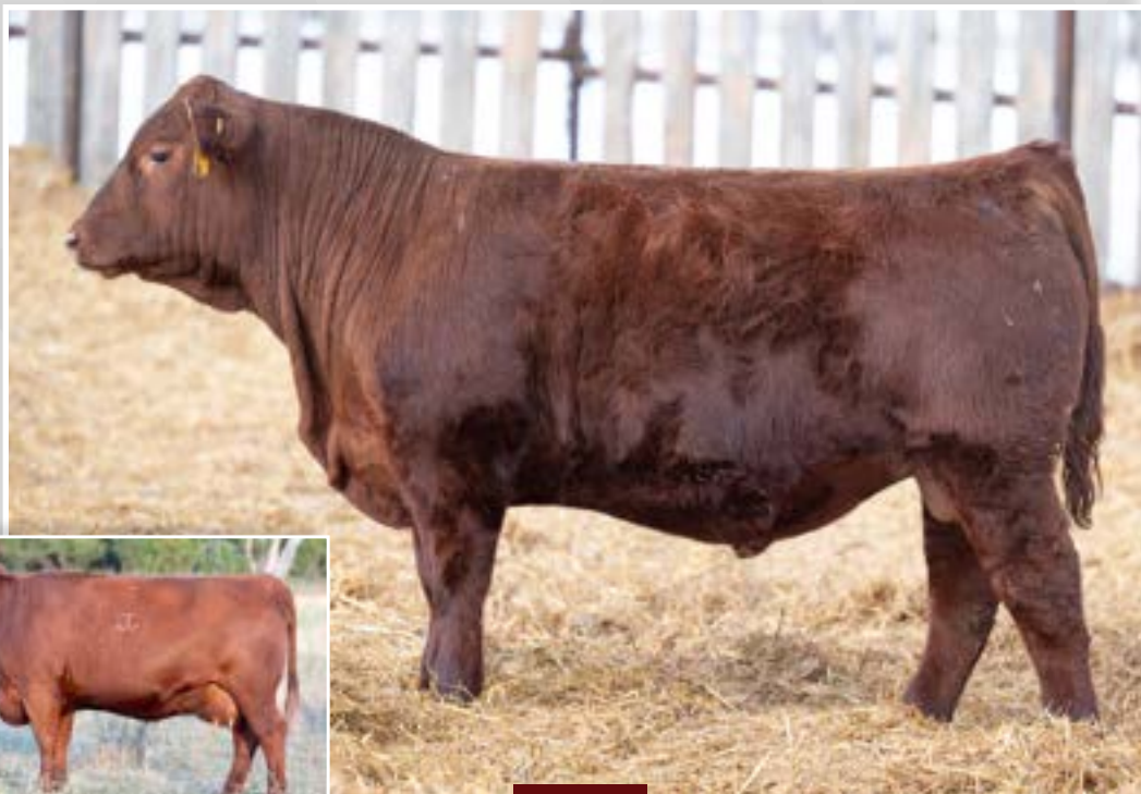
L83 FERNY 831F DAM

L83 Layton 36L is the blood red son of Intuition 832J that is long sided and built to inject extra growth potential, if you're searching for a super complete and balanced herd bull that will add pounds when it comes to weaning time then mark him for inspection. His Power Take Off sired dam is a full sister to the L83 Fannie 820F female that Zane showed to success. With 800 lbs. Coming to the weaning pen, he has always been one to catch attention, and we think he will find many friends on sale day.