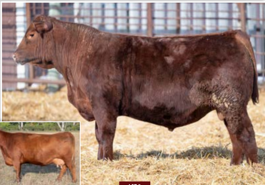
L83 ALL GIRL 20A DAM

L83 Luverne 29L is a direct son of the legendary, L83 All Girl 20A donor female that has reached six digits in lifetime earnings, of that over $100,000 is accounted for in daughters alone. With seven natural progeny to her name she still records an impressive, 722 lbs. average for weaning weight and a 101 DMPPA at 11 years of age. This dark hided, early March born son is maturing into an impressive, heavy muscled and rugged herd bull that is ready to go to work and his structural integrity suggests he will for a long time to come.