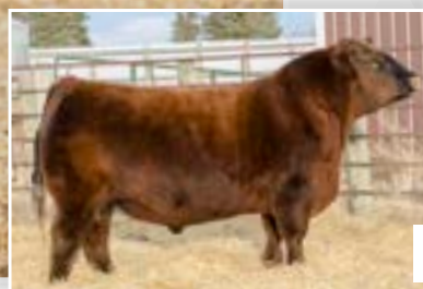
L83 2STRONG 13F

EPD's read impressive, with a top 4% WW ranking, top 3% YW, top 5% ADG and top 18% CW.