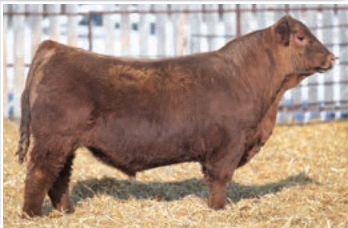
L83 KRUSER 16K 2023 HIGH SELLER WAS SOLD TO HUBER EY RED ANGUS - JUD, ND