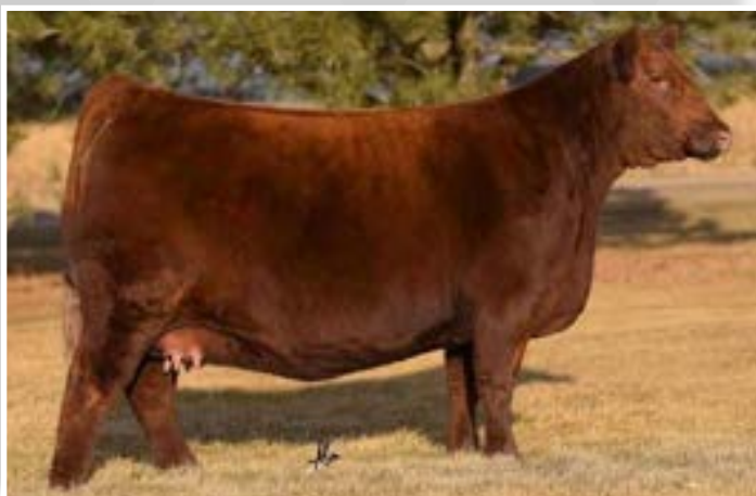
PZC FIRE QUEEN 813 ET DAM

A royal pedigree supports the bottom side of JK Township 101L's family tree. You will find 3 generations of industry renowned donor females in PZC Fire Queen 813 ET, Rojas African Queen 303 and Six Mile Lakoto 16W to build his maternal lineage. When it comes to consistency and reliability of a genetic base then it would be hard to trump what comes all inclusive with this Red U2 Township 17G son. Then add the power of U2 Beauty 113Z into the equation and we have truly aligned the stars here. The replacement females generated from the service of JK Township 101L will be the kind to build the cowherd around.