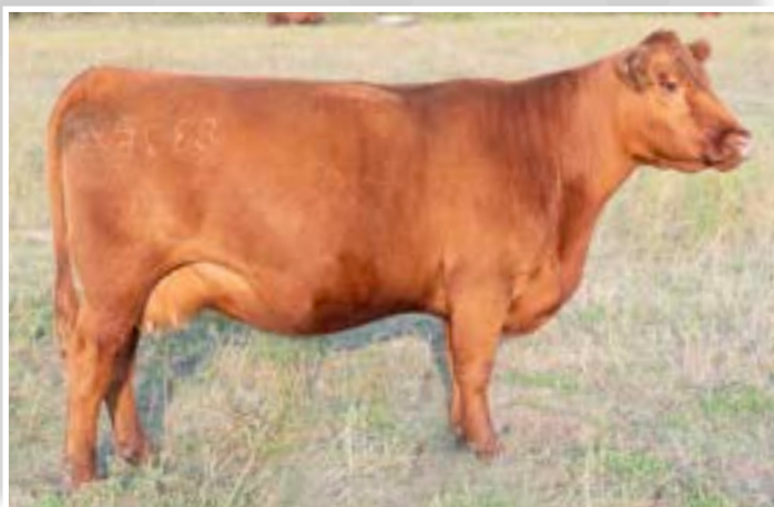
L83 SHAWNEE 837F DAM

Huge growth figures accompany this leading son of Six Mile GSF Jolt 452J sire group. You will also notice the inclusion of the maternal legend Six Mile Game Face 164Y in the pedigree of 21L through a beautiful daughter, so you can trust that there are generations of power built right into him. Phenotypically he is deep bodied and masculine, with a big set of feet and legs that will help him to cover cows out in big country. At weaning time L83 Hotwire 21L was ahead of the pack, and ever since has continued to increase this gap. A top 13% Weaning, top 20% Yearling, and top third Average Daily Gain help support the case of this high performance bull.