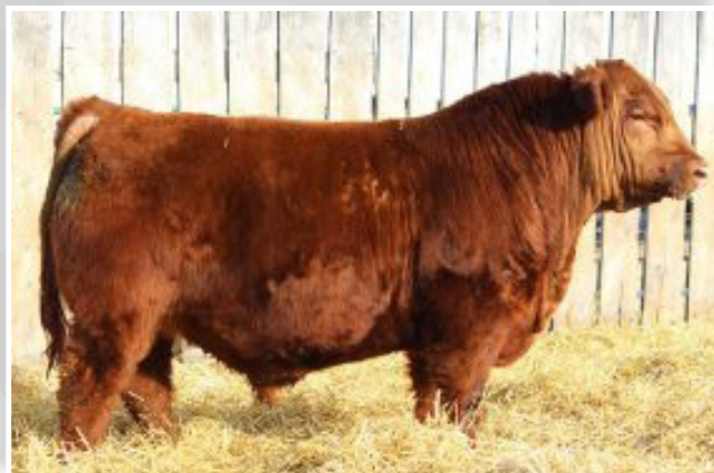
RED MRLA RESOURCE 137E SIRE