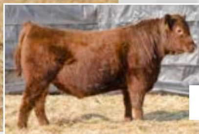
L83 JAGGER 7J SIRE

We have aligned some of the most influential sires in the history of the L83 Ranch, both Smoky Y Ozark 9131G and MCKY Josey Wales 8731 ET appear within the two most recent generations of L83 Latona 35L's pedigree. If you have followed our program you realize we place selection pressure on the kind that are low maintenance, easy keeping, and will thrive under the hard environmental stresses of the region, that's exactly the kind that 35L will generate.