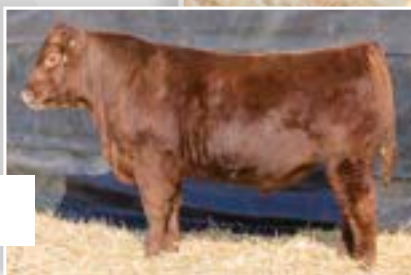
L83 JERRY 36J SIRE

L83 Litchville 19L is another direct son of the L83 All Girl 20A donor cow that has built a very impressive record of influential progeny and lifetime earnings. Even towards the end of the catalog you will find cattle that carry the backing of our richest cow families and most reliable pedigrees. This Josey Wales 8731 son is a maternal brother to Lot 5 and continues to live up the expectations of his pedigree with every step towards maturity. He weaned off at over 750 lbs. at weaning and accelerated towards an impressive 1320 lbs. of yearling weight.