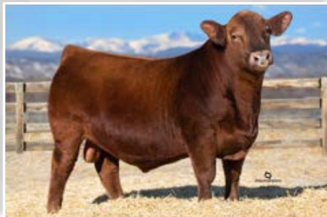
J6 MAXED OUT 121G SIRE