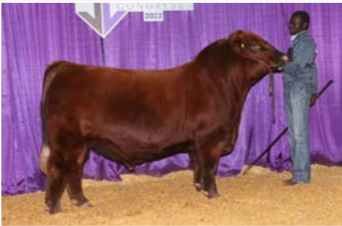
TLC MANN HANNITY 017H ET SIRE