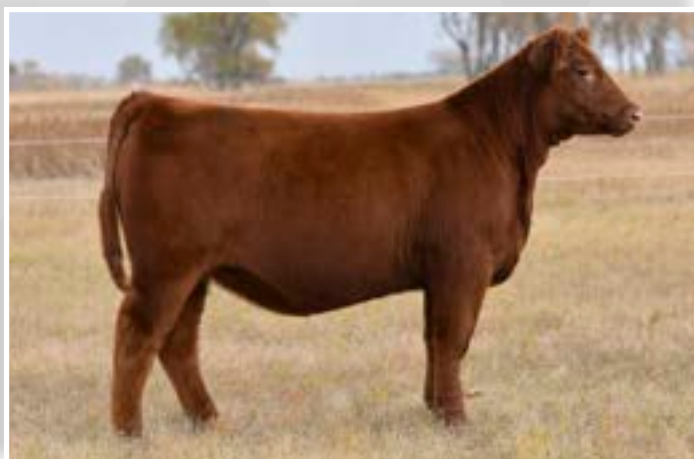
L83 KHLOE 247K MATERNAL SISTER