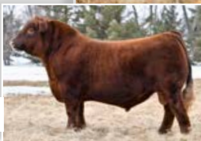
"JOSEY WALES" SIRE