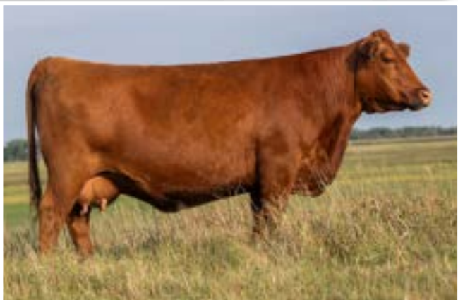
JK REBA 816D DAM