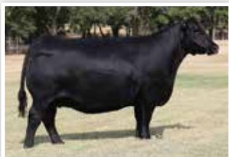
CONLEY SANDY 8104 Dam of Lot 63 Embryos