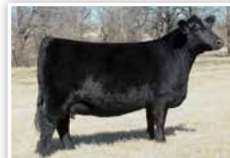
CONLEY SANDY 5104 Full Sister to Lot 65 Embryos