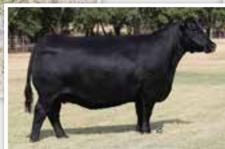
CONLEY SANDY 8104 $75,000 Maternal Sister to Lots 9 & 10