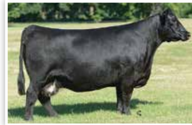
SILVEIRAS S SIS SANDY 2355 Dam of Conley No Limit

- Owned with Schaeffer-Tice Show Cattle.