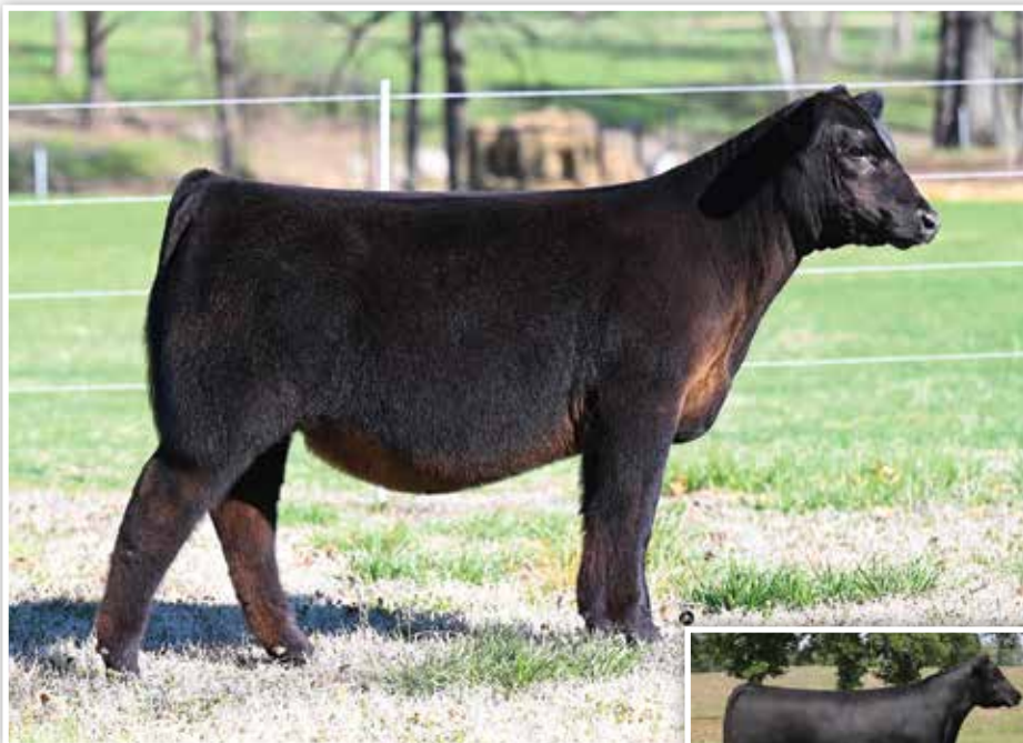
This mating never misses!

• Over two years ago we decided to dig back in the history books and resurrect the "Honey Bear Sophie" name when registering the daughters of Conley Sandy 8934. Honey Bear Sophie was the 1991 NALIE and 1992 NWSS Grand Champion Angus Heifer, ultimately being named the 1992 ROV Show Heifer of the Year. A short four years later she was named the 1996 ROV ET Dam of the Year. A daughter of Honey Bear Sophie, WK Sadie, was the 1996 NWSS ROV Grand Champion Angus Heifer. Two years later, another daughter, WK Sandy 6375, would be selected as the 1998 NWSS Grand Champion Angus Heifer, initiating the "Sandy" name. This foundation female in the Krebs Ranch breeding program is the matriarch of the "Sandy" cow family, a household name in today's industry!