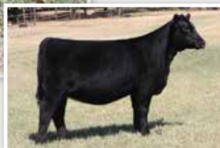
CONLEY HONEY BEAR 2147 $190,000 Full Sister to Lots 1-3

• Unlimited potential in the show ring, with a big upside when her campaign comes to a close and she enters production. We anticipate her to follow in the footsteps of her prolific donor dam and the females that line her pedigree!