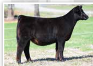
CONLEY DT GEORGINA 3807 Full Sister to Lot 66 Embryos She Sells as Lot 32!

PACKAGE 65A - Mated to EXAR Blue Chip 1877B 4 conventional embryos