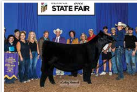
CONLEY FRKG QUEEN MEG 1085 2022 IN State Fair Supreme Champion Junior Breeding Heifer & Maternal Sister to Lots 16 & 17