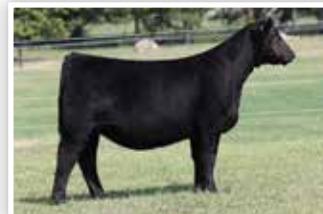
CONLEY HONEY BEAR 3762 $215,000 Full Sister to Lots 1-3

• A pair of full sisters sold in the fall of 2023 for $215,000 to the Oakley family of Tennessee and $135,000 to the Cook family of California.