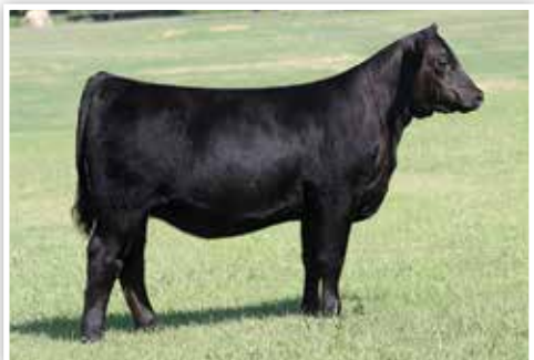
CONLEY MADDIE 3213 Full Sister to Lot 19