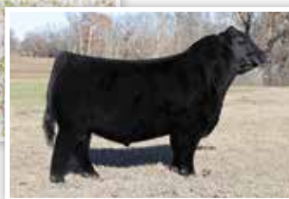
CONLEY RANSOM 1810 2022-2023 ROV Show Bull of the Year & Sire of Lot 44