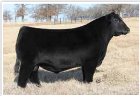
CONLEY LEAD THE WAY 0738 $920,000 Valuation Sire of Lot 18