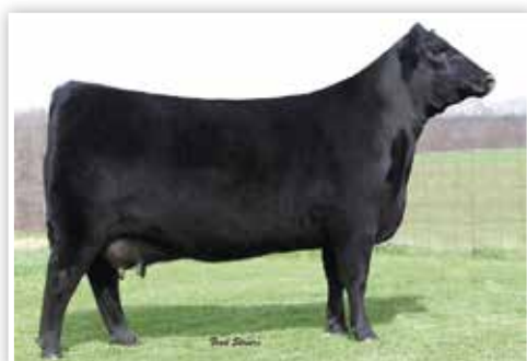
CHAMPION HILL GEORGINA 8547 Dam of Lots 33-35