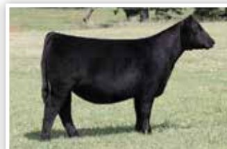
CONLEY HONEY BEAR 3638 $135,000 Full Sister to Lots 1-3