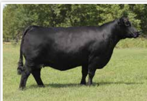
CONLEY S SIS SANDY 4350 Full Sister to Dams of Lot 4-8

- This female has a very bright future ahead of her, both on the tan bark and in the pasture!