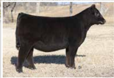
CONLEY DT GEORGINA 1061 Maternal Sister to Lots 28-32