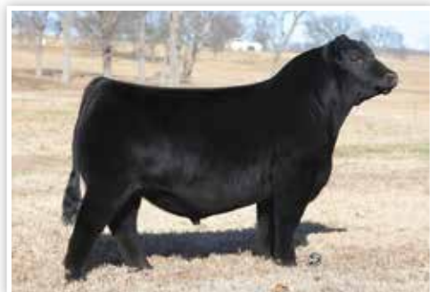
CONLEY DS CLEAR CUT 0510 $400,000 Valuation Sire of Lots 19-27