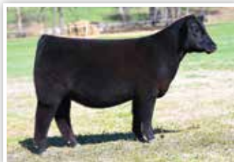
CONLEY DT BLACKBIRD 3910 Maternal Sister to Lot 59 Embryos She Sells as Lot 42!