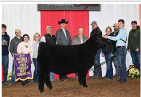
CONLEY MADDIE 3157

- Conley Maddie 3157 was selected as the 2023 Hoosier Beef Congress 4th Overall Junior Breeding Heifer for the Ferree family. We believe that 3735 offers a very similar build and body style to the popular champion. Don't let this one slip you by on March 30!