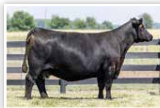
GAMBLES LADY 1084 Maternal Granddam of Lot 44