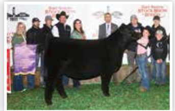
BK JELLY YUM 109J 2022 FWSS Grand Champion Maine-Anjou Heifer & Dam of Lot 49