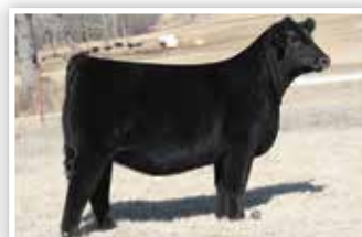
CONLEY DT SANDY 1078 Maternal Sister to Lots 9 & 10