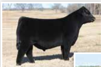
CONLEY AMERICAN EXPRESS 0159 Sire of Lot 47