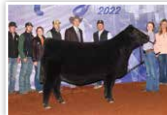
DIECKMANN LADY 1117 Dam of Lot 61 Embryos