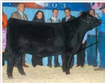
ROTH FOREVER LADY 2706