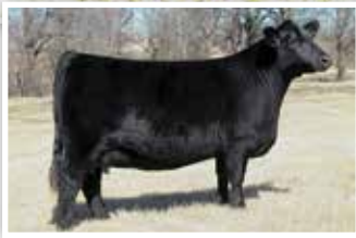
CONLEY SANDY 5104 Dam of Lot 100