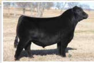
CONLEY DS CLEAR CUT 0510 $400,000 Valuation Full Brother to Lot 100