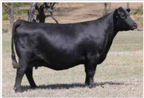
DOUBLE R BAR PURE PRIDE Z246 Maternal Granddam of Lots 38 & 39