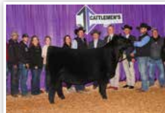
CONLEY FRKG QUEEN MEG 1085 Maternal Sister to Lot 64 Embryos