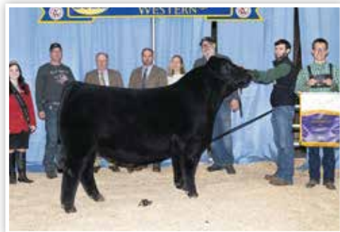
CONLEY DS CLEAR CUT 0510 2022 NWSS Grand Champion Angus Bull & Sire of Lots 19-27