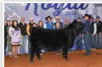
CONLEY FRKG QUEEN MEG 1085 2022 American Royal ROV Grand Champion Angus Heifer & Maternal Sister to Lots 16 & 17