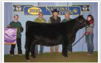
LLSF CAYENNE UP401 Maternal Granddam of Lot 48