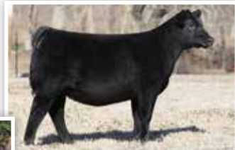
CONLEY DT SANDY 2507 $23,000 Maternal Sister to Lots 9 & 10

- This female's pedigree aligns some of the highest dollar generating females in the Angus breed!