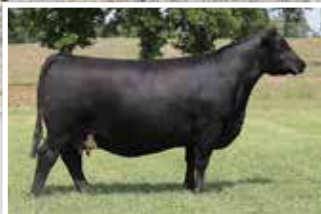
CONLEY SANDY 8934 Dam of Lots 1-3