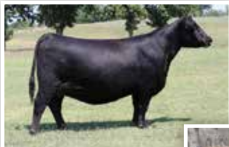
CONLEY DT SANDY 0213 Dam of Lot 11