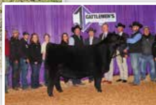
CONLEY FRKG QUEEN MEG 1085 2023 Cattlemen's Congress Supreme Champion Open Breeding Heifer & Maternal Sister to Lots 16 & 17