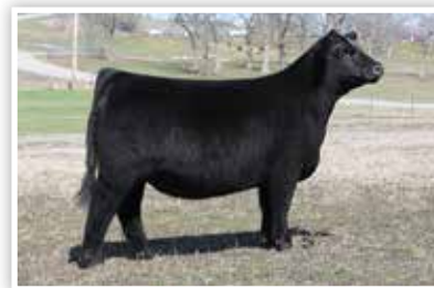
CONLEY BELL SANDY 2662 $40,000 Full Sister to Conley Bristow 2317