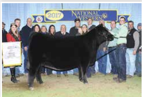
BCII SANDY 0215

2017 NWSS Reserve Grand Champion Angus Heifer & Full Sister to Maternal Granddam of Lots 12-15