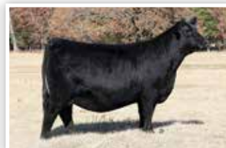
CONLEY DT GEORGINA 1076 3/4 Sister in Blood to Lots 28 & 29