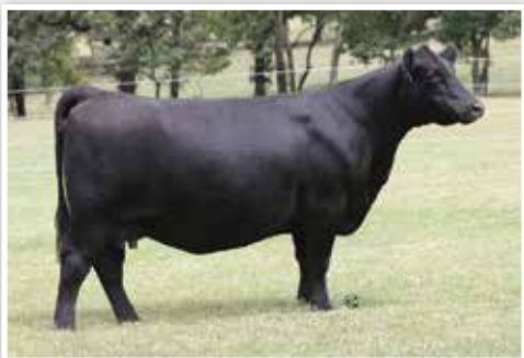
CONLEY PURE PRIDE 7117 Dam of Lots 38 & 39