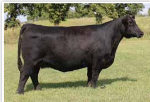
CONLEY S SIS SANDY 435 Dam of Lots 5-8