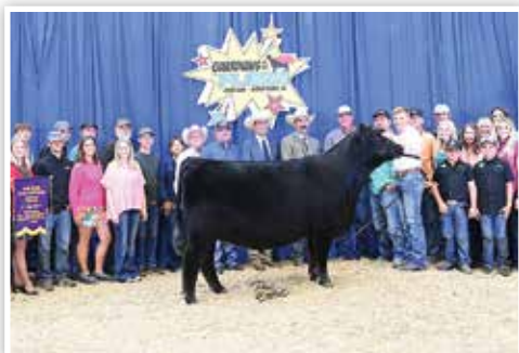
CONLEY DT GEORGINA 1076 2023 NJAS Grand Champion Angus Heifer Product of the "Georgina" cow family!