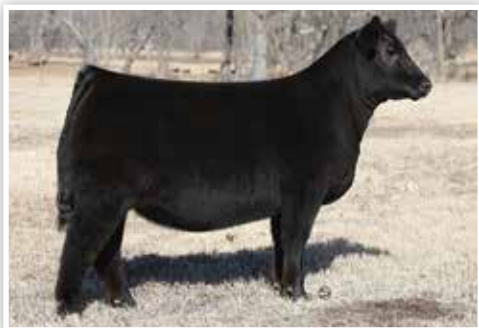
CONLEY DT BLACKBIRD 1067 $15,000 Maternal Sister to Dam of Lot 42