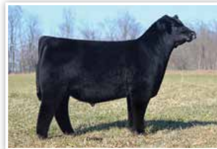
SFF ON POINT 4028 $100,000 Sire of Lots 28 & 29