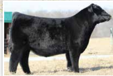
SCC SCH 24 KARAT 838 Popular Sire of Lots 30 & 31