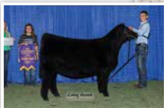
CONLEY SANDY 2300

- Maternal sisters to 3194 would also include Conley Sandy 9135 and Conley Sandy 9463, the 2021 NJAS Champion and Reserve Late Sr. Champion Females that were exhibited by the Dailey family. Conley Sandy 0165, the $40,000 selection of the Cronin family from Georgia and Conley Sandy 7305, the $105,000 sale topping female in 2017 that was purchased by J6 Farms of Nebraska.