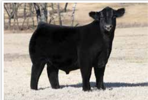
CONLEY A 1 $100,000 Sire of Lots 5-8