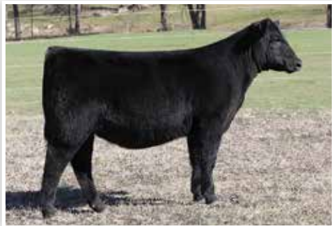
CONLEY DT LUCY 2556 Full Sister to Lot 40