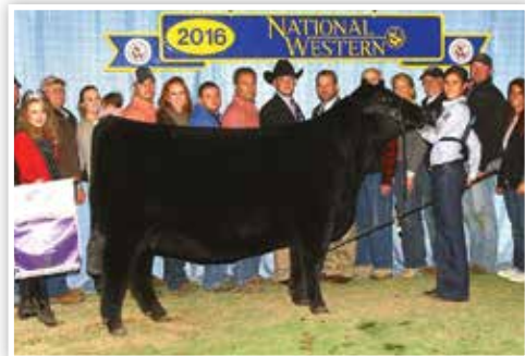
FCF PROVEN QUEEN 419 Maternal Granddam of Lots 36 & 37