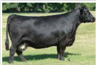
SILVEIRAS S SIS SANDY 2355 Dam of Lot 62 Embryos