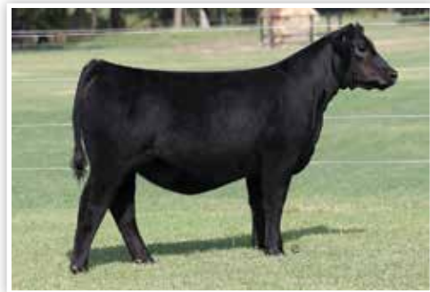
CONLEY MADDIE 3176 Full Sister to Lots 19-27