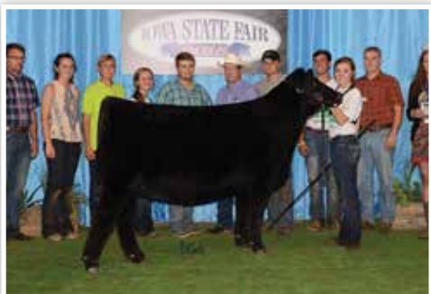
PLUM CREEK ANNIE LU 4472 Paternal Granddam of Lots 34 & 35