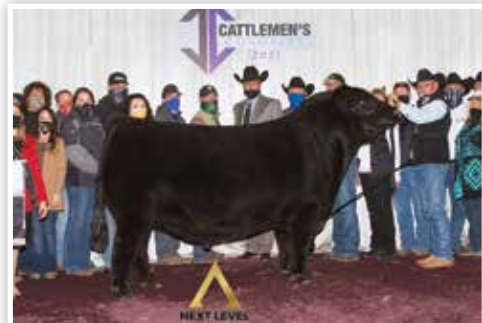
SILVEIRAS FORBES 8088 Sire of Lot 37