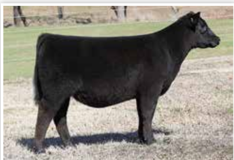
CONLEY DT SANDY 2321