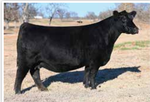
SCHELSKE MSF MADDIE 8229 Prolific Dam of Lots 18-27