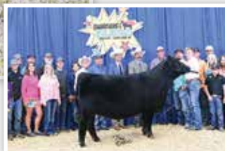
CONLEY DT GEORGINA 1076 2023 NJAS Grand Champion Owned Heifer & 3/4 Sister in Blood to Lots 28 & 29