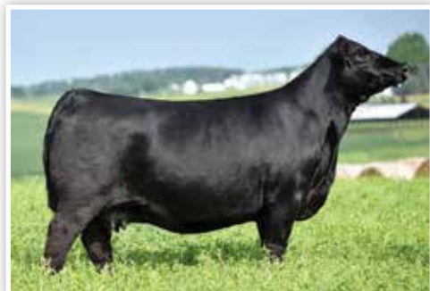
BCII SANDY 1315 Maternal Granddam of Lots 12-15