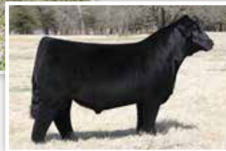
R/C SFI CREEDENCE 417J Sire of Lot 48