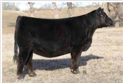
BBPB PIO LASS 1094 $10,000 Maternal Sister to Lot 41