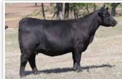
CONLEY SANDY 8355 Dam of Conley Red Zone 1121