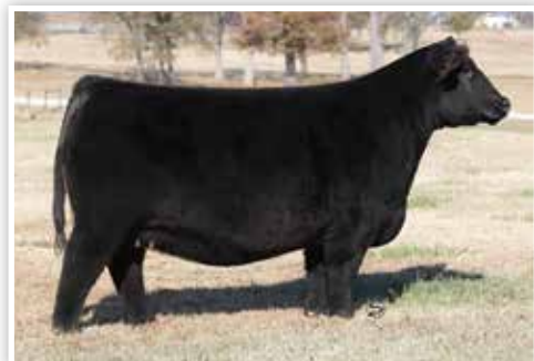
EXAR PRINCESS 1637 Paternal Granddam of Lot 32