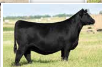
HOFFMAN PEG 9539 Full Sister to Dam of Lot 47