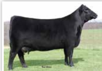
CHAMPION HILL GEORGINA 8547 Dam of Lot 60 Embryos