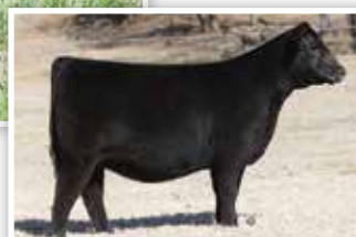
CONLEY DT SANDY 1056 $35,000 Maternal Sister to Lots 9 & 10

- This female has the build and genetic lineage to go the distance! Invest in the future of your breeding program with the addition of a female of this caliber that has the potential to follow in the footsteps of the females that line her pedigree!