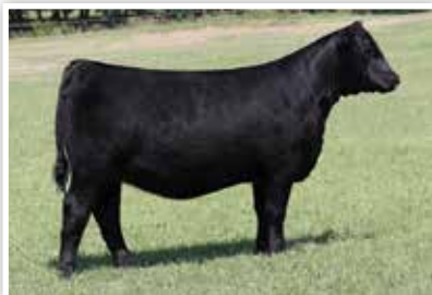
CONLEY MADDIE 3810 Maternal Sister to Lots 18-27