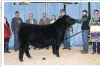
CONLEY DS CLEAR CUT 0510 $400,000 Valuation Full Brother to Lot 100