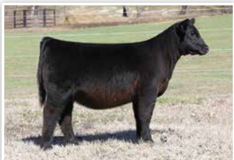
CONLEY HONEY BEAR 2110 $180,000 Full Sister to Lots 1-3