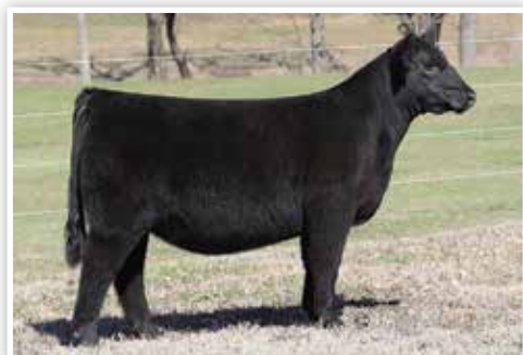
CONLEY DT SANDY 2900 $140,000 Full Sister to Lot 13

- Her neck attachment comes high out of the topside of her shoulder, while remaining big topped and bold in her rib cage. She is stout hipped and wide pinned. This female will be a fun one to campaign at every stage and competitive at every level!