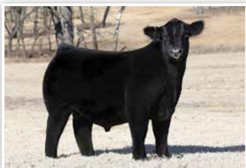
CONLEY A 1 $100,000 Sire of Lots 42 & 43