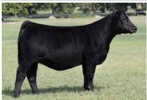
CONLEY MADDIE 3157 $220,000 Full Sister to Lots 19-27

- 3618 has been a standout since day one, offering a supreme look of quality and eye appeal that is hard to mirror. Much like her sisters, she is elegant in terms of her pattern with an ultra-high quality build that is sure to go the distance!