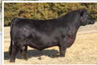
C-4 GCC PLAY IT SAFE H420 Sire of Lot 49

- We admire this female for her flawless build, bold rib design, and futuristic look of quality. The Maine-Anjou Junior Nationals is just a short drive up the road in Springfield, Missouri. Anyone that has ever taken their family always raves about what a fun and family oriented week the AJMAA does hosting this event. Bid with confidence, this female is very high quality!