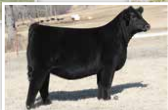
CONLEY DT SANDY 1078 $90,000 Granddaughter of K N C Cabin Creek Sandy 804