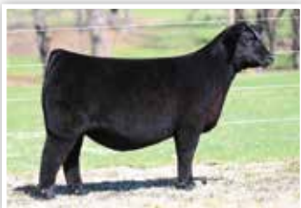
CONLEY DT MISS LUCY 3701 Full Sister to Lot 58 Embryos She Sells as Lot 40!