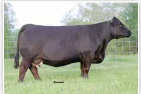
STF ONYX 451W

Maternal Granddam of Lots 39, 40, &amp; 42