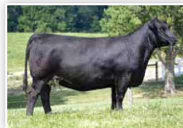
HILB CAUGHT LOOKIN B929