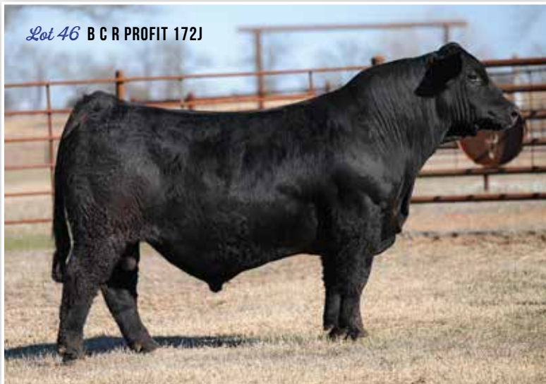
Lot 46 B C R PROFIT 172J