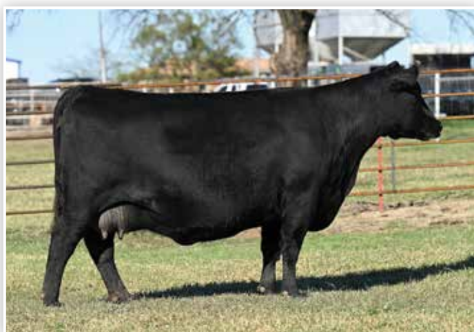
WERNER BLACKCAP 3079 Maternal Granddam of Lot 9