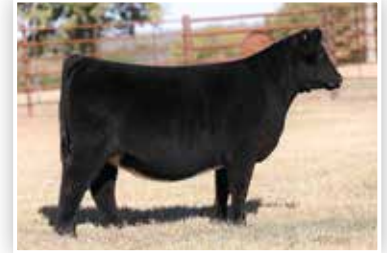
B C R SIoux L042 Full Sister to Lot 7