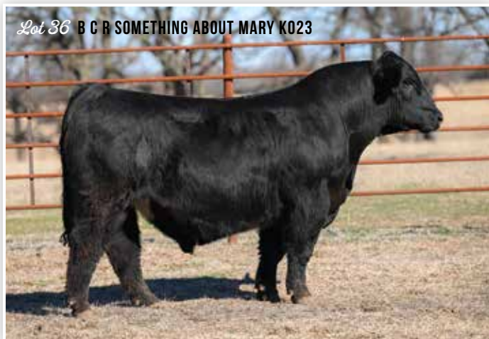
Lot 36 B C R SOMETHING ABOUT MARY K023