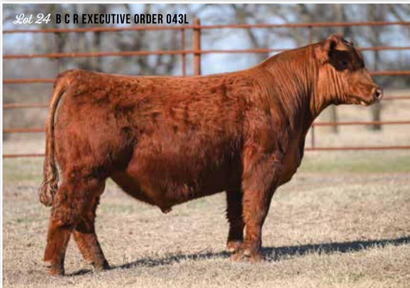
Lot 24 B C R EXECUTIVE ORDER 043L