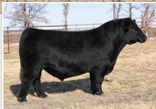
RP/BCR EMINENCE H005 Sire of Lots 3-8