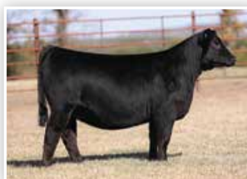
B C R ALLEY L086