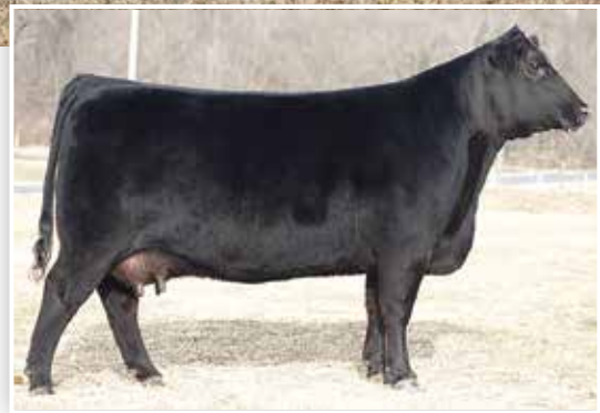
COVELLS CHEYENNE 0523 Maternal Granddam of Lot 2