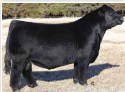
JSUL SOMETHING ABOUT MARY 8421 Sire of Lots 36-38