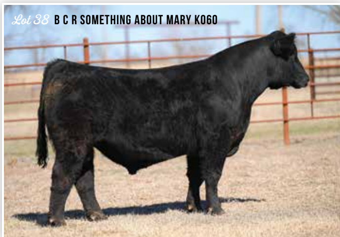
Lot 38 B C R SOMETHING ABOUT MARY K060