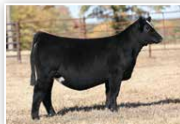
B C R SACAJALIA K099