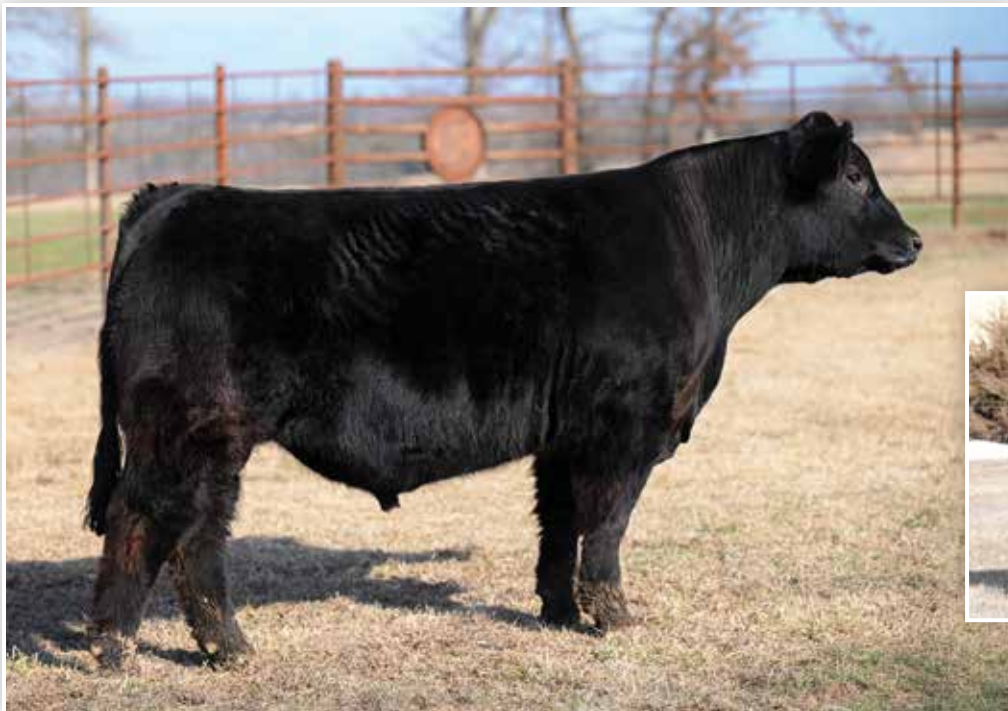
Lot 41 B C R RELENTLESS 170K