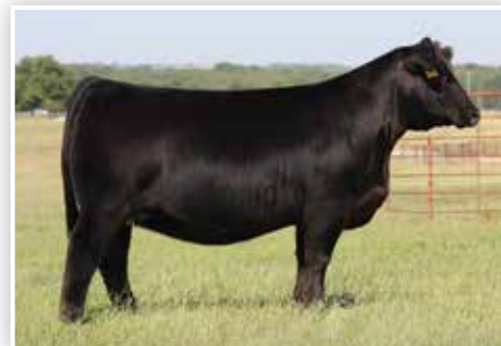
B C R BLACKSTAR H005 Maternal Sister in Blood to Lot 15