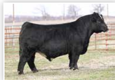
B C R GIDEON J031