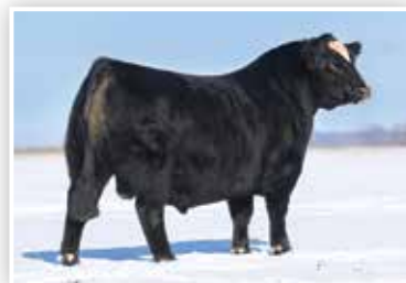
B C R PERFECT VISION Sire of Lot 22