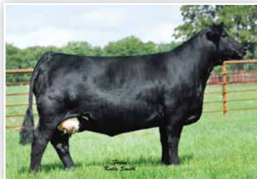
RP/MP BUILT TO LOVE A021 Paternal Granddam of Lots 3-8