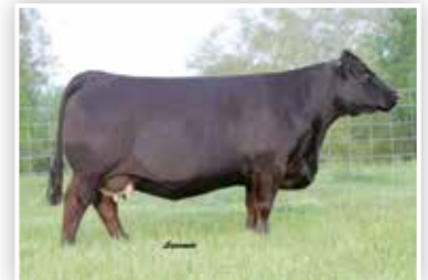
STF ONYX 451W 3rd Generation Dam of Lot 5