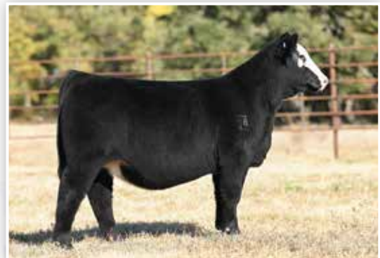
B C R PRECIOUS K103 Maternal Sister to Lot 14