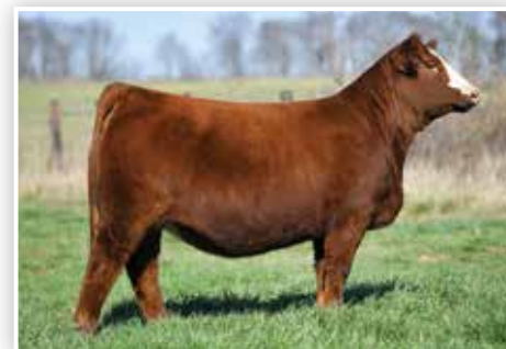
B C R TIME TO SHINE 182G Three-Quarter Sister to Dam of Lot 24