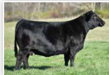
MISS TIME TO SHINE Y251