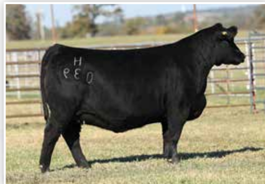
B C R QUEEN MOTHER H039 Maternal Sister to Lot 19