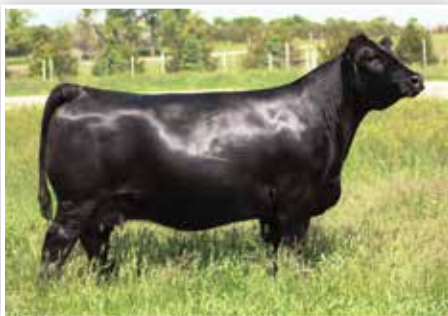
MISS WERNING KP 8543U