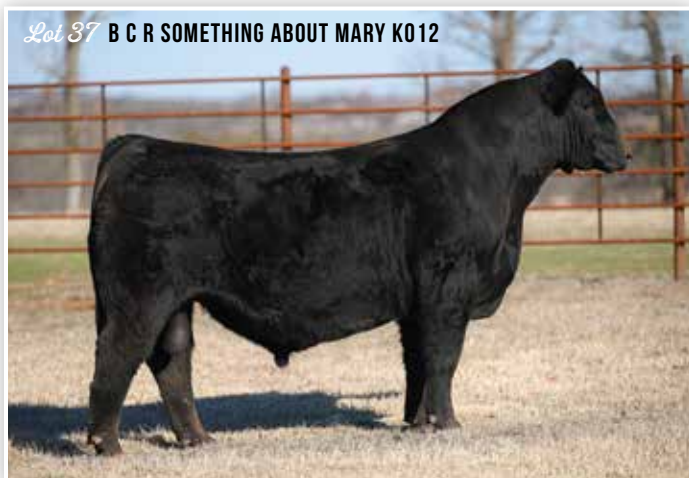
Lot 37 B C R SOMETHING ABOUT MARY K012