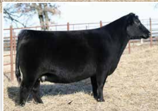
SILVEIRAS S SIS SANDY 2352 Maternal Granddam of Lot 1