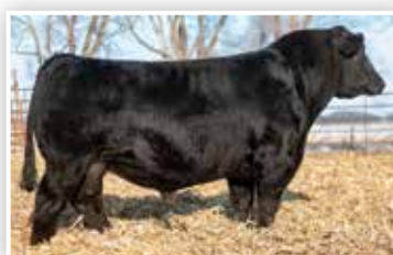
W/C DOUBLE DOWN 5014E