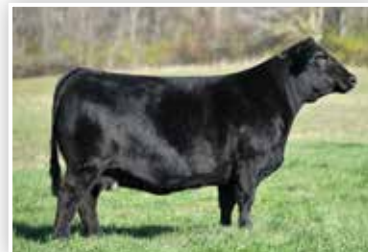
MISS TIME TO SHINE Y251