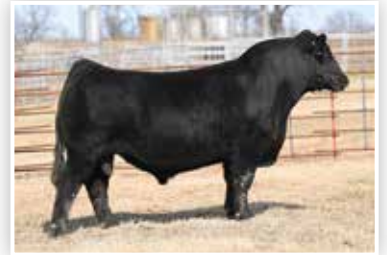
B C R COPACETIC H020