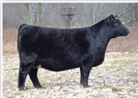
CMFM TIME TO SHINE 99D