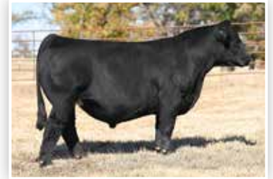
B C R PLATINUM 309H