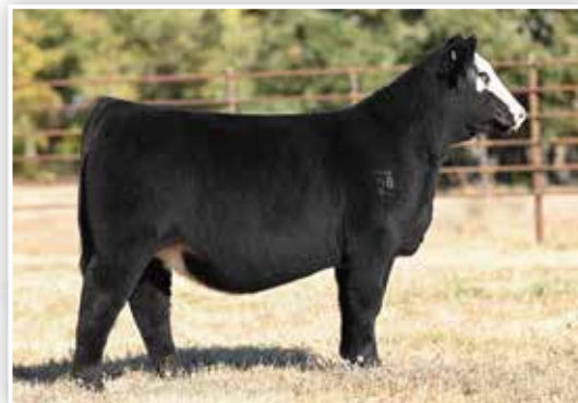
B C R PRECIOUS K103 Maternal Sister to Lot 6