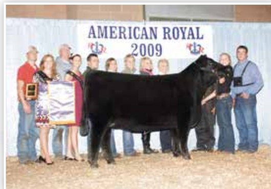
K N C CABIN CREEK SANDY 804 Legendary 3rd Generation Dam of Lot 1