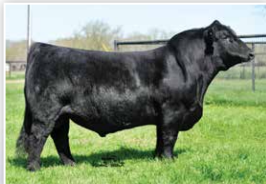
HPF QUANTUM LEAP Z952 Sire of Lot 29