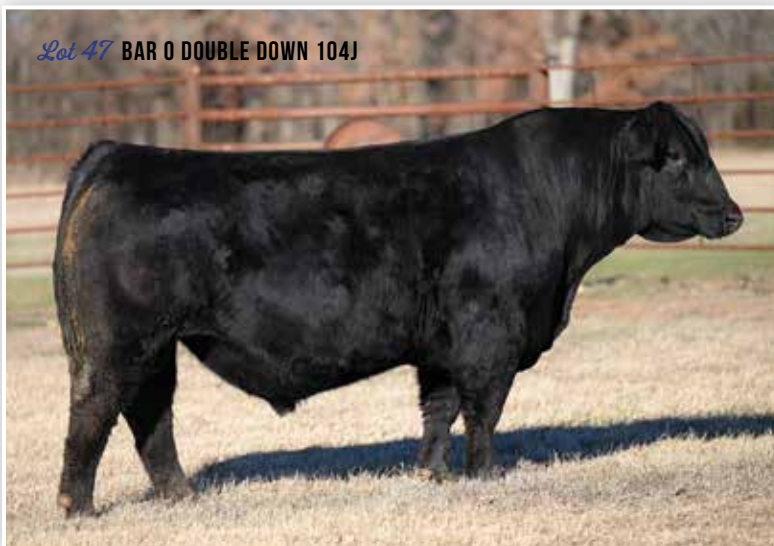
Lot 47 BAR O DOUBLE DOWN 104J