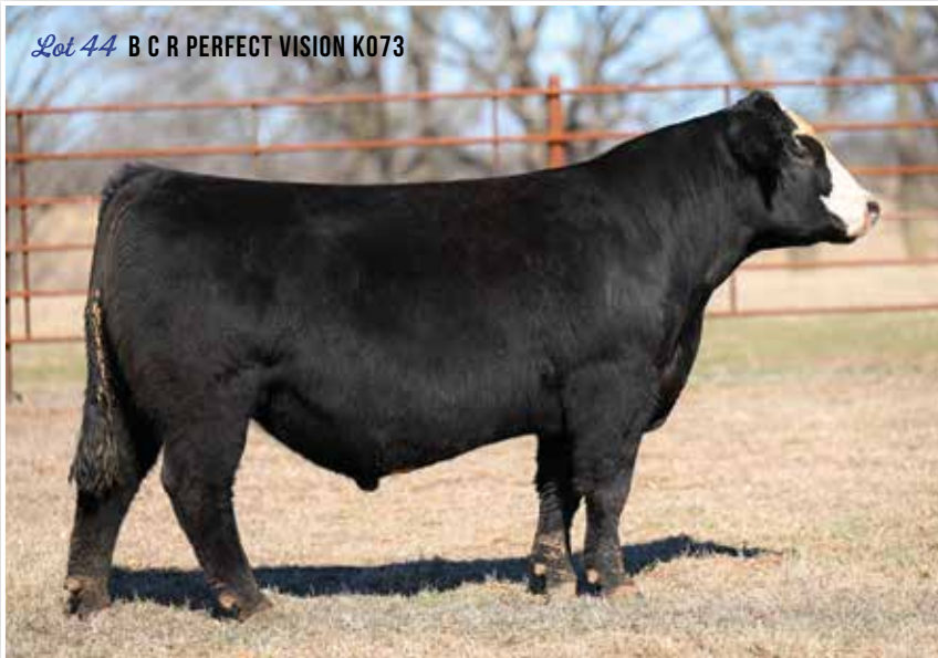
Lot 44 B C R PERFECT VISION K073