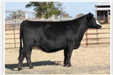
B C R STOP & SEE G083