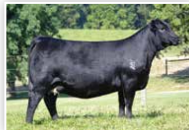
HPF RIGHT TO LOVE C083 Dam of Lot 23