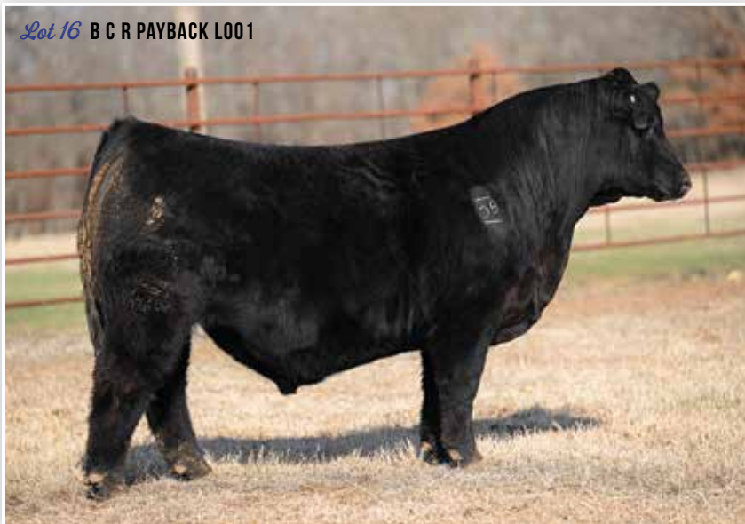
Lot 16 B C R PAYBACK L001