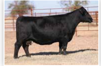
BRAMLETS/HFS LUCY B415 Dam of Lot 4