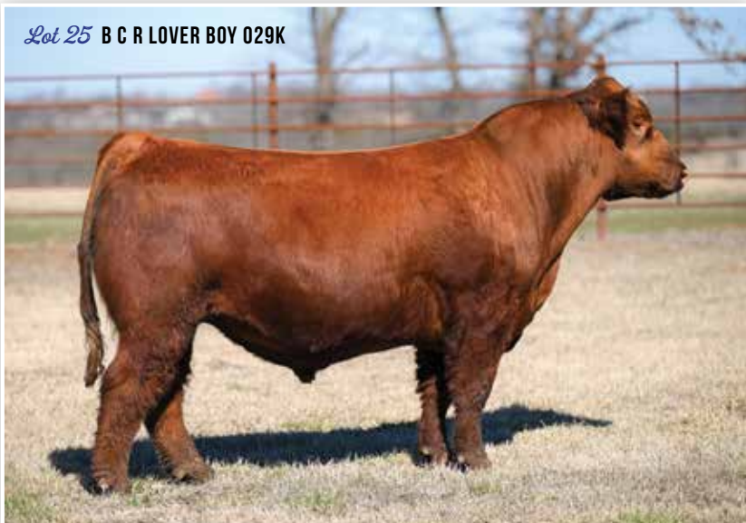
Lot 25 B C R LOVER BOY 029K