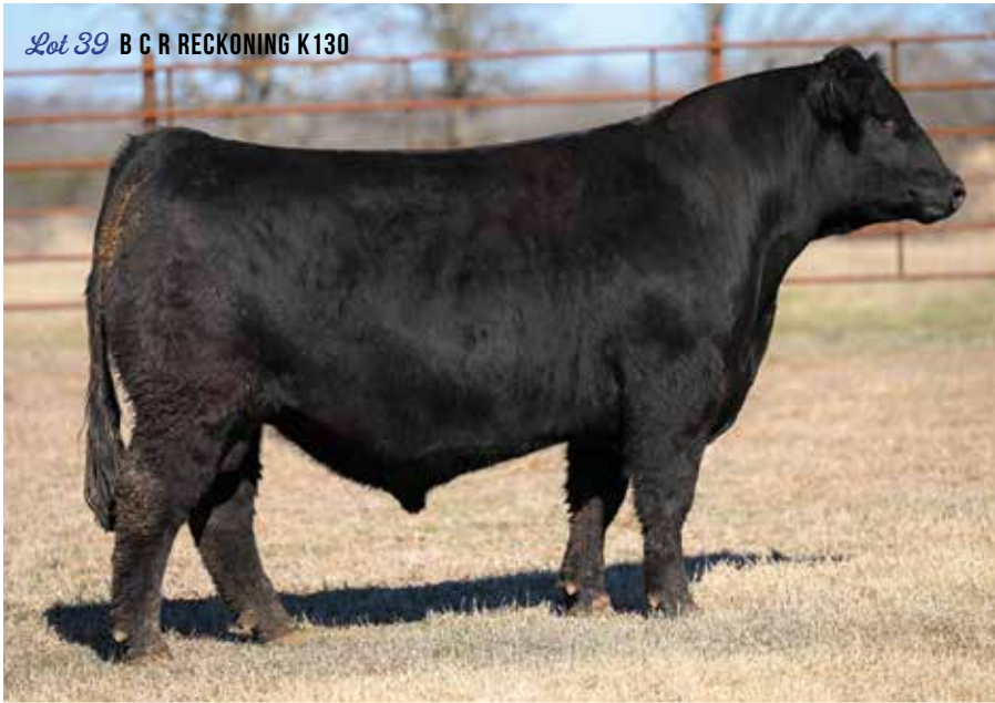
Lot 39 B C R RECKONING K130