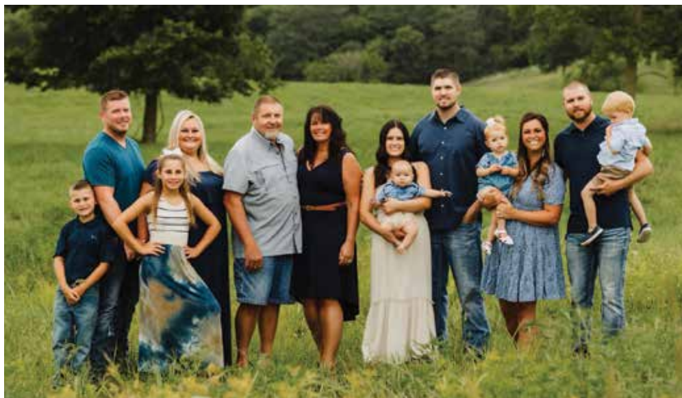
The Moore Family