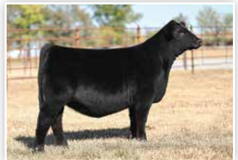
B C R TIME TO SHINE 074K