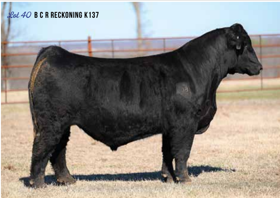
Lot 40 B C R RECKONING K137