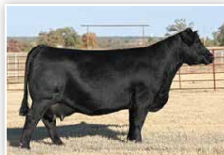
CMFM BLACKSTAR 059B Maternal Granddam of Lot 15