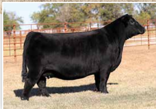
JSUL DREAM BIG 8992F $70,000 Dam of Lot 29