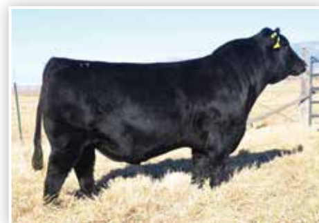
THSF LOVER BOY B33 Sire of Lots 25 &amp; 26