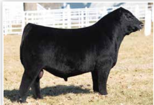
BNWZ DIGNITY 8017 Sire of Lots 1 & 2