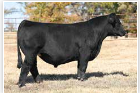
B C R PLATINUM 309H