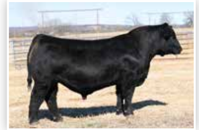
B C R CROSSROADS H185