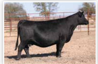
WERNER MADAME PRIDE 4114