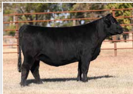
B C R PRECIOUS K013 Maternal Sister to Lot 6