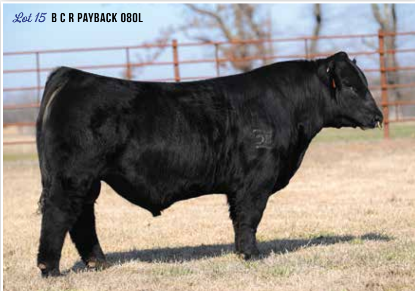
Lot 15 B C R PAYBACK 080L