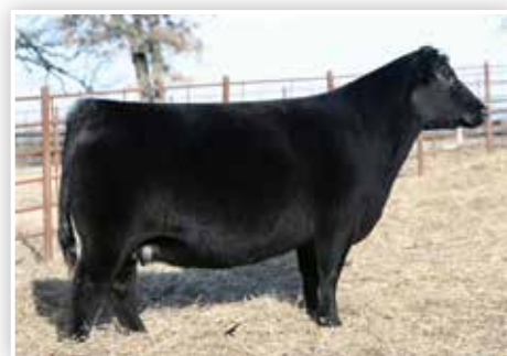
SILVEIRAS S SIS SANDY 2352 Maternal Granddam of Lot 16