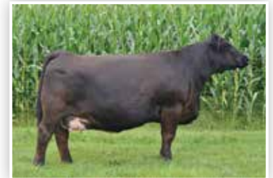
SHAWNEE MISS 770P