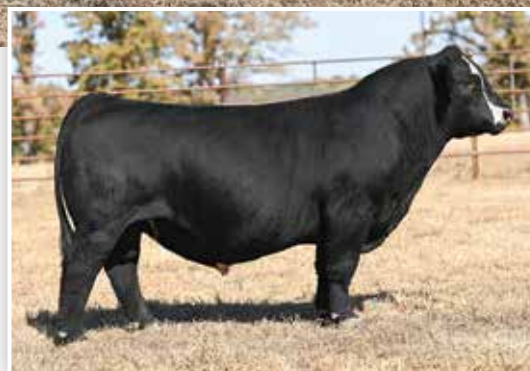
HCCO PAYBACK 166H Sire of Lots 15-21