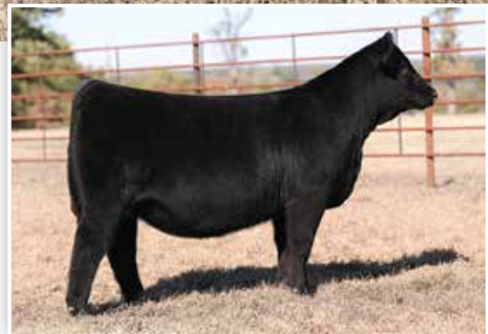
B C R PRECIOUS L044 Full Sister to Lot 14

LLSF PAYS TO BELIEVE ZU194 x WOMACK PRECIOUS MISS