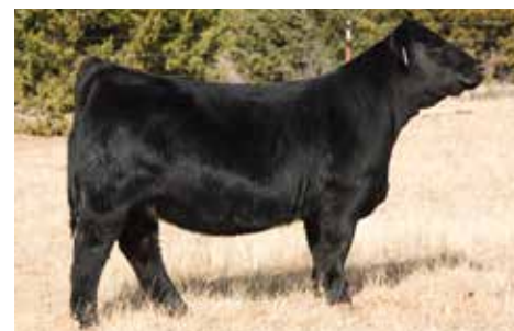
K-LER DOLLY'S LADY 810F DAM OF LOTS 11-12

A neat profiling bull that lacks nothing in terms of his amount of sheer mass and volume. Here is an opportunity to own one of two maternal brothers out of the K-LER Dolly's Lady 810F donor, both sired by ES Right Time FA110-4. This stud ranks in the top 10% YW, REA, top 15% WW, CW, top 25% DOC, top 35% TI. An excellent candidate to improve growth traits in your calf crop. Full sister to 314L's dam sold for $19,000 in H20 dispersal to Mast Simmentals.