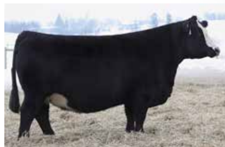
K-LER BARBIE 455B ASA: 2953254