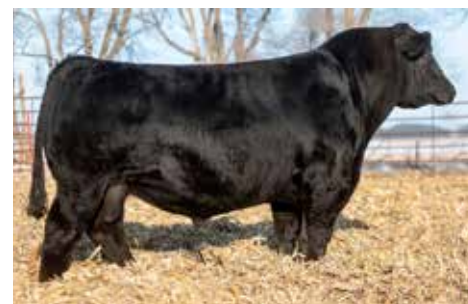
W/C DOUBLE DOWN 5014E SIRE OF LOT 18