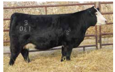
ES E130 MATERNAL GRANDDAM OF LOT 29

Another quality stud in this sire group, just in a different hide color. KLER Sauce 3140L is a red baldy with the same style and stature as his darker hided pen mates. He is homozygous polled and excels at traits that are vital to the success of a beef operation: calving ease, longevity, and carcass merit. Top 1% STAY, top 10% API, top 15% CED, BW, MCE, MARB, TI, top 25% MILK. His dam is a past high selling female, entering the Wendtland program in 2022 at $10,500 for half interest.