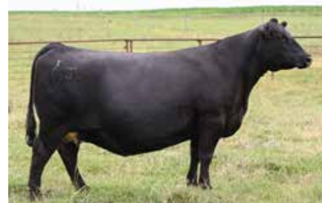
RIVERBEND QUEENIE C353 DAM OF LOT 47-50