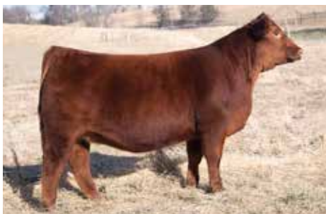
KLER BOLD & BEAUTIFUL ASA: 3783942