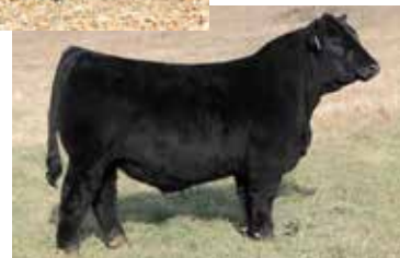
KLER STELLAR 031J FULL BROTHER TO LOT 54 & 55