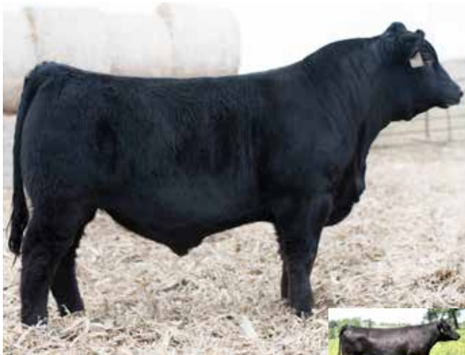
K-LER DOLLY'S STAR - DAM OF LOT 30