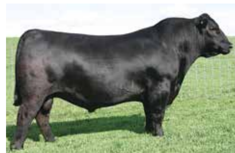
S A V BISMARCK 5682 SIRE OF LOT 47

Leading off the Angus division is KLER Brookings 3066L. Sired by breed stalwart SAV Bismarck 5682, and out of our cornerstone donor Riverbend Queenie C353. He is a neatly made young gun with plenty of power and shape for an Angus bull. 3066L is a maternal brother to KLER Formula 1, who sold to Genex and Express Ranches for $60,000.