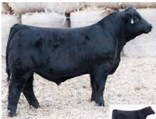
KLER BARBIE 084H DAM OF LOT 37

3099L is a bull that you appreciate for being correct in his structure with some added style and stature. Polled, purebred prospect with a different twist on the pedigree that you can utilize to take a set of calves anywhere and catch people's eye.