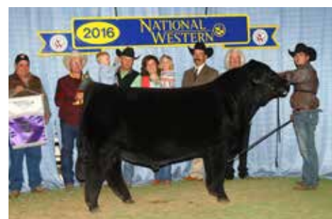
THSF LOVER BOY B33 SIRE OF LOT 45

At only 64 lb. at birth, this is a red bull that still packs some punch and dimension. A son of the popular THSF Lover Boy B33, he also adds some carcass merit in his genetic profile. Ranks in the top 25% MARB, top 30% TI, top 35% REA. The dam of 301L was the high selling bred heifer in the 2023 One & Only sale in Denver, commanding $19,500 for half embryo interest to Gold Standard Cattle, IA.