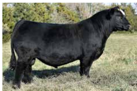
W/C FORT KNOX 609F SIRE OF LOT 33