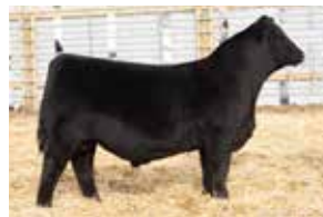
KLER PROMOTER G15 SIRE OF LOTS 64 & 65