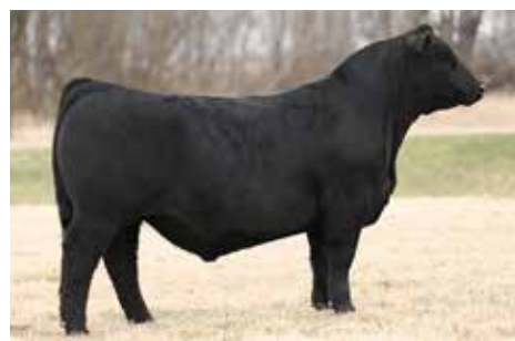
KLER RIGHT DESIGN 012J $180,000 SIRE OF LOTS 13-15

This one is a looker! KLER Goose 3039L is a sharp looking bull with loads of eye appeal, but also checks all the boxes of a functional breeding bull. You will love his length, mass, and structure at the ground. Plus, he is homozygous polled! From the first crop of KLER Right Design 012J, he's a prime example why we are excited about these Right Design progeny. Genetically, he is balanced and ranks well for several traits of economic merit. Top 30% CED, BW, top 35% WW, YW, CW, TI.