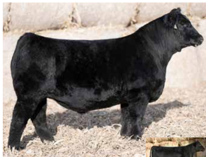
KLER MS ELODIE 096J DAM OF LOT 38