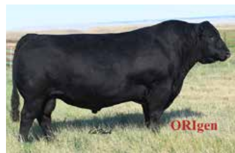
SYDGEN ENHANCE SIRE OF LOT 48-50

3137L is a maternal brother to KLER Formula 1, who sold to Genex and Express Ranches for $60,000. He's long sided, great in his structural design, and attractive in his look. This son of Sydgen Enhance and our Riverbend Queenie C353 donor is one of three full brothers in the Angus offering this year. Take advantage of the chance to add that uniform genetic pool to your calf crop.