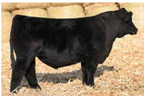
KLER NATION 2087K | ASA: 4096021 PASTURE SIRE AT KLER CATTLE OF BRED HEIFERS