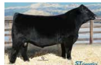
RFG/KLER ELEVATION 727E GRANDSIRE OF LOT 83

Due to calve 5/4/24 to KLER NATION 2087K (ASA: 4096021). When looking for a pedigree saturated with the most potent cow families in the business then it is hard to pass up the one that comes with KLER Elodie 2084K. Her dam is the first born natural daughter of the iconic WS Miss Sugar C4. C4 has a resume of maternal brothers to the dam of 2084K that is too long to fit on the page and continues to add to that still to this day. There is no questioning the importance of cow family when looking into a consistent generating investment, you can trust in having the best in the business supporting here!