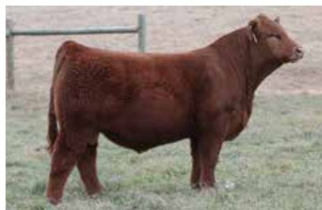
KLER BASIS 048J MATERNAL BROTHER TO LOT 25