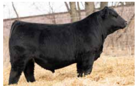
FIVE STAR JACKSON J10 SIRE OF LOTS 27-29

A Fiver Star Jackson J10 son out of a dam from the storied Werning program, 3047L is a bull that is well balanced in both his appearance and his genetic makeup. Weighed over 800 lb. on his weaning weight. Ranks in the top 10% REA, top 30% CED, top 35% MCE. KLER Two Step 3047L is a well-balanced, versatile breeding bull.