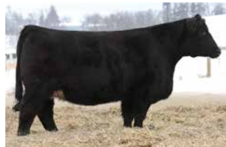
KLER BARBIES ORDER 970G DAM OF LOTS 1-3

A fitting introduction to the 2024 KLER Cattle Company offering, KLER Muscle Man 3014L is a phenotypic masterpiece, combining herd bull presence, a good set of running gears, shape and capacity through his middle body, and stout, powerful features from every angle. His pedigree is structured for success, stemming from the KLER Barbies Order 970G donor cow and KBHR Revolution H071, the most prolific sire line in this year's offering. To top off this special creature, his genetic profile reads just like you would draw one up on paper, ranking in the top 5% CW, top 10% WW, TI, top 15% YW, top 20% DOC, top 25% MARB, API, top 30% BW. The 918 lb. WW he posted is top end of the offering. If you want a bull that combines all the key elements of a purebred herd sire, here he is.