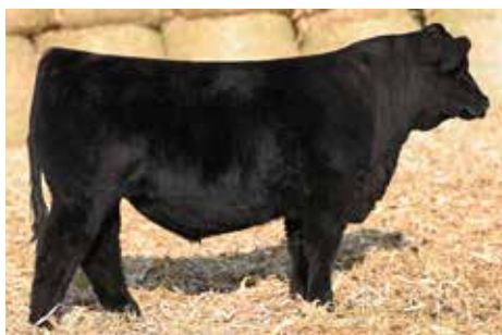
KLER NATION 2087K SERVICE SIRE OF LOT 66

Due to calve 4/4/24 to KLER NATION 2087K (ASA: 4096021). KLER Haleys Queen 2074K represents the next generation of high growth, purebred genetics. This LEERS Turnpike 333G female is backed by the maternal power of an W/C Executive Order 8543B sired dam. A quick look into her performance data reveals top 2% WW, YW, ADG & BF, top 3% CW and top 15% MWW & REA. Here sells a potent source of growth and inevitably profit.