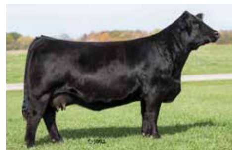
HF SERENA LEGENDARY DAM OF LOT 18

Step up to the plate of improving your herd bull battery with KLER Grand Slam 3019L. The length and muscle shape of 3019L is undeniable, yet he is still smooth shouldered, good in his lines, and has an attention getting profile. This W/C Double Down 5014E son hit the scales heavy at weaning, tallying an 871 lb. WW. His homozygous black status will keep his calves black hided when they top the market at the sale barn. Ranks in the top 10% for REA to add carcass cutability to his steer progeny. Here's the kind of bull that will catch attention across your neighborhood when you turn him out.