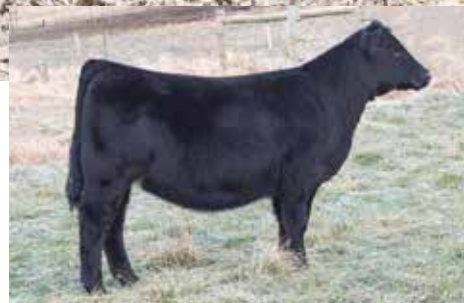
KLER/RFG MS PROPHET 092J MATERNAL SISTER TO LOT 60