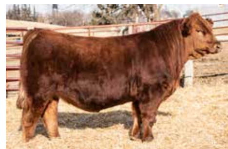
KLER LAW & ORDER H5 SIRE OF LOT 46

Like any good Sargent, this 3007L red bull will certainly command your attention. He's attractive in his design, with a big, stout hip and bold shape. The son of KLER Law & Order H5 is homozygous polled and posted a 107 WW ratio with his 917 lb. WW. Top 3% REA, top 4% MILK, top 20% CW, top 30% WW, top 35% BW, YW, TI. You will appreciate this bull in the pens, on paper, and in your pasture.