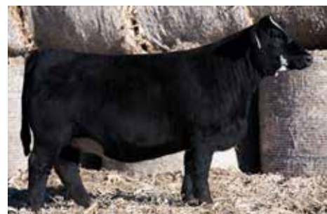
KLER HARLEY 2008K MATERNAL SISTER SELLING AS LOT 57

3006L is a smoothly designed, long bodied herd sire prospect that reads with structural integrity. A continuation of the KBHR Revolution H071 sire line, adding power and growth to a calf crop in many breeding situations. Ratioing 106 at weaning from an 80 lb. BW, here's a bull that performed admirably while carrying that genetic prowess in his EPD figures as well. Ranking in the top 2% WW, top 3% YW, top 15% MILK, REA, top 25% CW, TI, top 35% DOC. To top it all off, he is both homozygous black and homozygous polled. It's not a bold prediction to say that you will like this one on sale day! A maternal sib also sells in this sale. **Denver bull