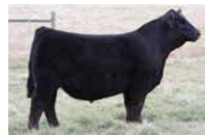
KLER ALL IN 052J