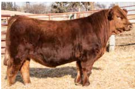
KLER LAW & ORDER H5 | SEMEN $35 ASA: 3783950 OWNED WITH SLOUP SIMMENTALS, ABERCROMBIE CATTLE CO., DENNING SIMMENTALS, TRI E LIVESTOCK