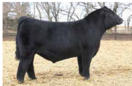
OMF HARD RIGHT H1 SIRE OF LOT 12

The older brother of the pair, KLER Handyman 2225K is an age-advantaged maternal brother to 314L. He is a strong, growthy rascal that is ready for heavier service. Like his brother, his genetic merits are impressive for adding performance to a set of cows. Ranks in the top 10% YW, REA, top 15% WW, CW, top 25% DOC, top 35% TI. An additional merit to this brother: he is homozygous polled! Dam is a full sister to a $19,000 donor at Mast Simmentals.