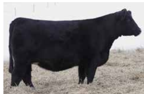
KLER QUEEN 040H MATERNAL SISTER TO LOT 6