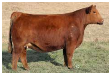
SSF SAZERAC S10H DAM OF LOT 41