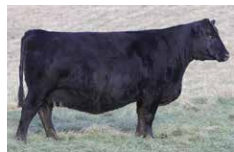
KMJ/K-LER MS PROPHET D3008 DAM OF LOT 19