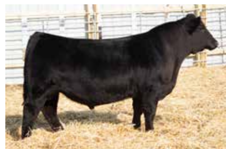
KLER LINEBACKER 05G MATERNAL BROTHER TO LOT 22

KLER Karl Wayne 3035L carries as much muscle expression as any in the offering with a set of genetic figures that hit the mark on a variety of traits. A homozygous polled son of KLER Promoter G15, 3035L has as strong of a birth to weaning spread on his actual performance data as you will find in this year's sale. Ranks in the top 10% REA, top 15% YW, top 20% WW, top 25% CED, MCE, MILK, combining for a unique mix of calving ease, growth, and maternal merit. Maternal sib sells in this sale as well.