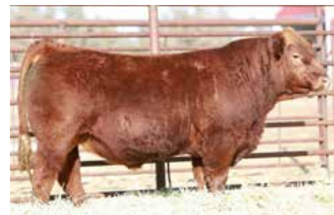
BAR CK RED EMPIRE 9153G SIRE OF LOT 44

One of the best sons of Bar CK Red Empire 9153G that you will find. 171L is smooth in his design, soggy made, and has the build of a functional herd sire. Homozygous polled with a genetic profile that highlights calving ease and carcass cutability. Top 4% REA, top 20% DOC, top 30% CED, BW, MCE. You're going to have a lot of good marks on this red baldy in your catalog.