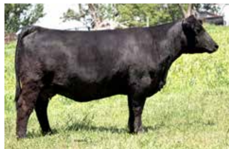
K-LER RAIN MARIE DAM OF LOT 15

3060L will give your herd a clear vision into the future. He is an attractively built calf with length of body, plenty of muscle shape, and good foot size. One of the lighter birth calves in the offering, he still weighed off at an impressive 855 lb. weaning. He'll keep the calf crop black hided and smooth polled, testing homozygous for both. You'll have this son of KLER Right Design 012J on your short list for a high quality, balanced trait sire. He is a half sib to last year's high selling, KLER Elusive. Ranks in the top 25% STAY, top 30% CED, MCE, top 35% YW, API to produce daughters that will be money makers without sacrificing calving ease.