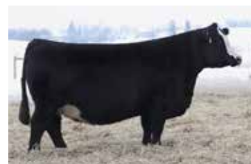
K-LER BARBIE 455B DAM OF LOT 53-56