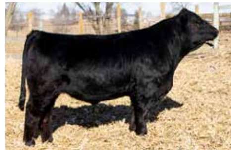
K-LER FRANCHISE 804F SIRE OF LOTS 72-74