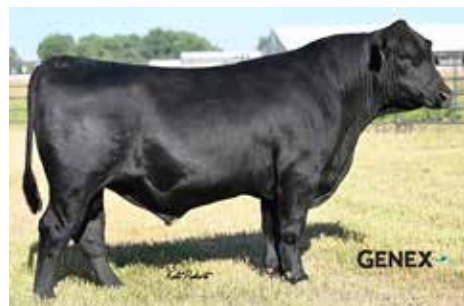
KLER FORMULA 1 | AAA: 20207825 OWNED BY GENEX AND EXPRESS RANCHES SEMEN AVAILABLE AT GENEX OR EXPRESS RANCHES