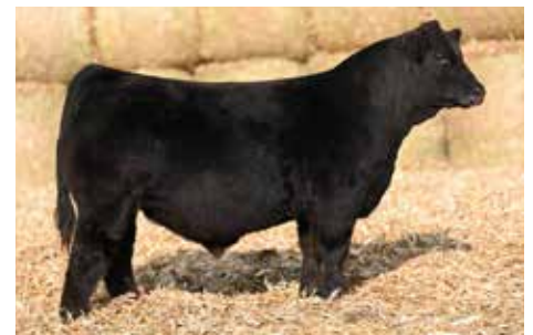
KLER PROMOTION 2053K MATERNAL BROTHER TO LOT 28