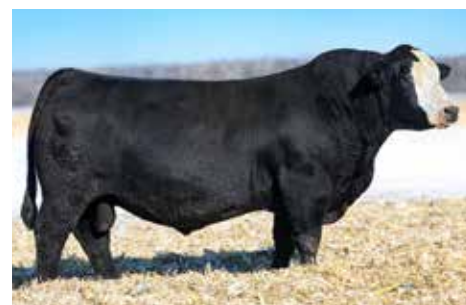
KBHR REVOLUTION H071 SIRE OF LOTS 1-10