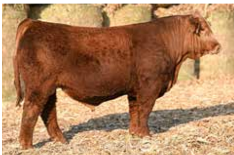
KLER RED WOLF 2029K | SEMEN $40 ASA: 4095970 OWNED WITH MIKE TROGSTAD, SD