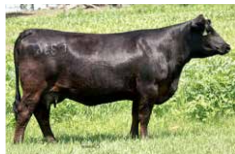
KMJ/K-LER MS ROBUST D336 $30,000 DAM OF LOT 61-63