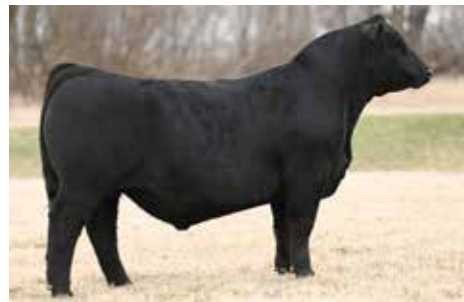
KLER RIGHT DESIGN 012J | ASA: 3919420 OWNED WITH EASTON MEL FARMS