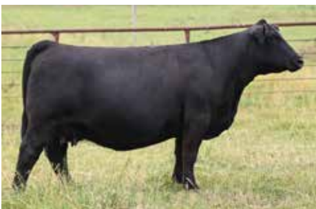
ELLINGSON/STR HOPE H026 DAM OF LOT 42

Homozygous polled standout red baldy bull. This one is good livestock from the ground up, from all angles. Solid profile, great design, and plenty of true shape and muscle highlight his features. Strong growth and carcass rankings on the genetic profile for this son of W/C Fort Knox 609F (top 15% REA, top 25% WW, MARB, top 30% TI, top 35% YW). His dam brought $21,000 in the H20 dispersal, and he is a half sibling to a $25,000 seller. Anonymous 3005L will make himself known on sale day. **Denver bull