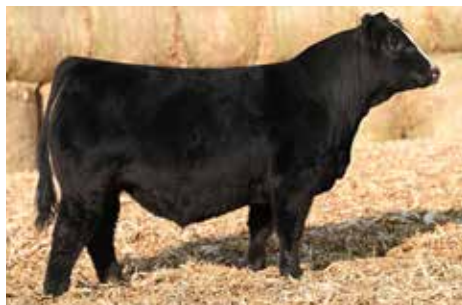
KLER ELUSIVE 2117K | SEMEN $35 ASA: 4096044 OWNED WITH YARDLEY CATTLE CO.