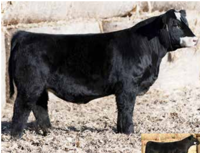
KLER YFF LORETTA MATERNAL SISTER TO LOT 31

The only son of the Select Sire star TJ Main Event 503B in this year's sale, Main Man L4 reads with extra length of body and extension. Tested as homozygous for both black and polled, this is a bull should be heifer safe. A pair of full brothers have been popular sale features in the past, selling for $12,500 and $10,500 to Gilliland Livestock. Ranks in the top 10% BW, top 20% CED, top 35% API. Study your lesson here!