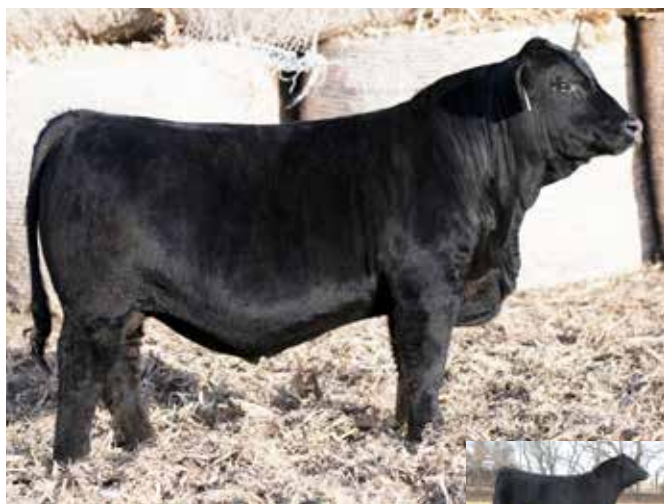
OMF HARD RIGHT H21 SIRE OF LOT 35