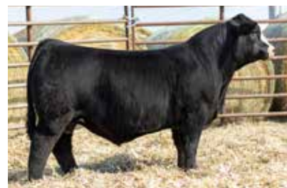
KBHR REVOLUTION H071 SIRE OF LOT 59-61

Due to calve 1/15/24 with a Heifer Calf by KBHR REVOLUTION H071 (ASA: 3789458). The three daughters of KMJ/K-LER Ms Robust D336 are the flush mates to the most demanded set of bulls that we sold in 2023. They are directly tied to one of the breeds exciting new comers that is making a large splash in the infancy of her production career. Not only do her stock find friends when inspected in the pens, but they quickly sort to the top on paper as well, not something that happens very often! The CDI Trustee 387F sired female of the trio is the most acceptable in her calving ease and birthweight, but still offers exceptional growth and carcass quality.