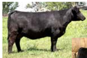
K-LER RAIN MARIE DAM OF LOT 64

Due to calve 1/15/24 with a Bull Calf by CLRWTR CLEAR ADVANTAGE H4G (ASA: 3858588). The bull mates to these KLER Promoter G15 daughters found swathes of admires in the 2023 Production Sale, and again for 2024 prove their value as cattle that demonstrate that impressive data sets do not require a compromise of functional build. This is a maternal sister to last year's $40,000 high selling bull KLER Elusive that sold to into the Yardley Cattle Company program. She comes from some of the best maternal pedigrees we can offer, as K-LER Rain Marie is a role model example of the ideal Simmental female in our opinion. With a performance driven pedigree, purebred status, homozygous polled and black tested and flawless phenotype this female has all the credentials of a cornerstone breeding piece.