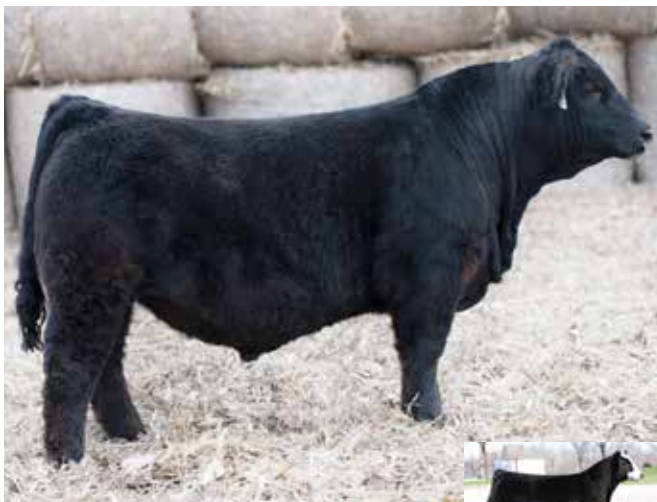
ISSC/TSSC HEIR APPARENT 003H SIRE OF LOT 32

L48 is stout built, long spined, and has plenty of phenotypic quality. The extra chrome on his face will draw your attention to a good bull in the sale pens. We all want to have a good-looking bull walking our pasture, and this rascal will do just that. Don't overlook this WHF Entourage H450 son on sale day.