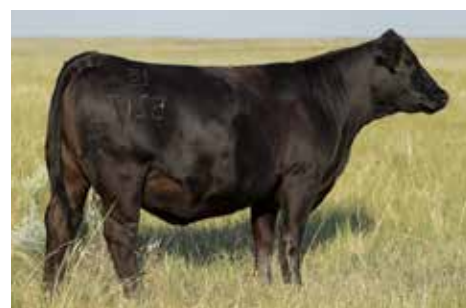
LEES DIXIE ERICA 5217 DAM OF LOT 59