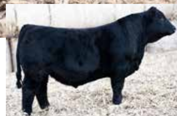
KLER MUSCLE MAN 3014L SON OF LOT 53