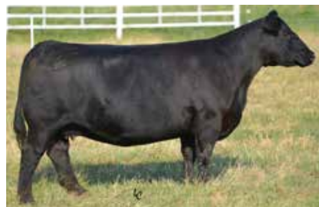
GW MISS GPRD 028X MATERNAL GRANDDAM TO LOTS 53-57