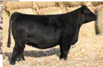
KLER BARBIE 007J FULL SISTER TO LOT 54 & 55