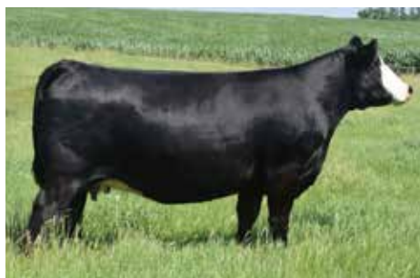
KLER/RC MISS HOYA SAXA ASA: 2577373