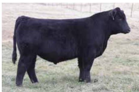
KLER GAINS 032J SIRE OF LOT 41

Here is a stout, stocky red-blood sire prospect with plenty of rib shape and volume. You will appreciate the added stoutness, foot and bone size on this one. Maternal sibling sells in this sale's bred female offering. Top 20% BW, top 30% REA. He is one to watch.