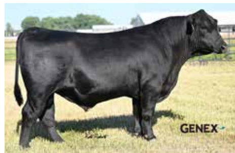
KLER FORMULA 1 MATERNAL BROTHER TO LOTS 47-50

A deep ribbed, soggy made member of the Sydgen Enhance x Riverbend Queenie C353 flush, 3136L is yet another maternal brother to KLER Formula 1, who sold to Genex and Express Ranches for $60,000. This cow never misses, so pass on those strong maternal genetics into your herd and end up with a killer set of females.