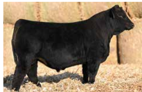
KLER COMBINATION 2081K MATERNAL BROTHER TO LOT 5