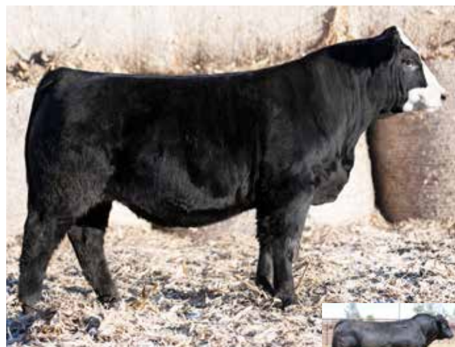
KBHR QUIGLEY C154 SIRE OF LOT 39

68L is yet another strong phenotype bull that will warrant extra consideration in the pens on sale day. The length of body and neatness in the front portion of his body align with his low birth, easy calving genetic scorecard. Ratio at a 102 for his WW, plus, he is homozygous black and polled. Circle this blaze faced dude if you have heifers to breed. Top 3% MARB, top 4% API, top 10% BW, TI, top 20% STAY, top 25% MCE, top 35% MILK. A well-rounded genetic package.