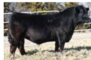
MR SR 71 RIGHT NOW E1538