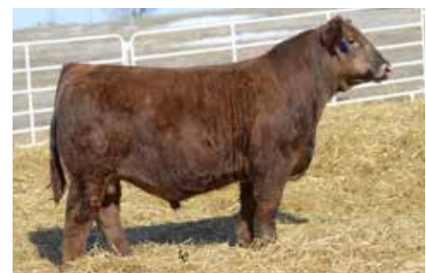
KBHR SNIPER E036 SIRE OF LOT 79

Due to calve 2/12/24 to KLER NATION 2087K (ASA: 4096021) . KLER Queen 2003K is an outcross to a majority of the red hided stock that you will find, and she becomes particularly impressive when you check out the dynamic EPD profile that accompanies her influence. She more than excels when it comes to calving ease predictions, yet still reads with profitability across the board. We think she has the structural build that opens up the door to generating stock that find acceptance from show heifer or herd bull production.