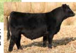
KLER ELUSIVE 2117K MATERNAL BROTHER TO LOT 64