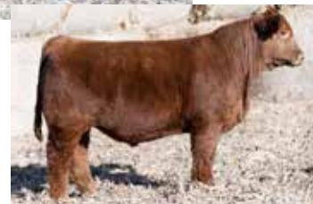
KLER RED LINE 3100L - MATERNAL BROTHER SELLING AS LOT 41