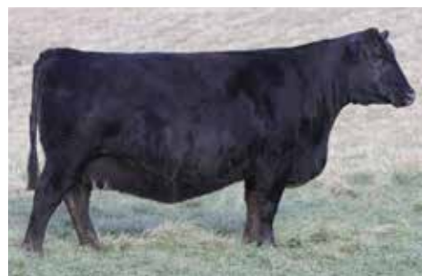
KMJ/K-LER MS PROPHET D3008 DAM OF LOT 60

Due to calve 3/23/24 to CK/K-LER/RFG LIMITLESS 6052D (ASA: 3235334).