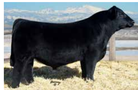
K-LER KINGSMAN 610D - SIRE OF LOT 19

Secure your herd with a prospect like L1. KLER Security L1 is homozygous black and polled with loads of capacity. Combining high growth and strong maternal genetic merits, the only son of the $48,000 K-LER Kingsman 610D suits a variety of breeding programs and production goals. Posts rankings in the top 2% YW, TI, top 4% MARB, top 10% WW, CW, API, top 25% MILK, REA.