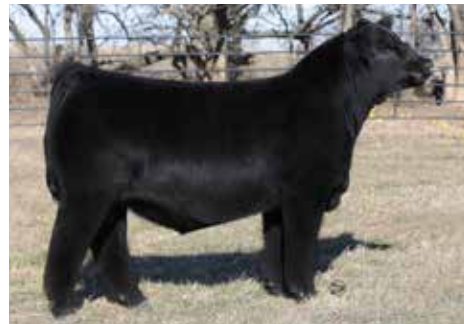
STCC TECUMSEH 058J $620,000 SIRE OF LOTS 16 & 17

When you see him in the pens, KLER/YFC Beast L45 lives up to his name. Here is a square built, good bodied, well balanced blaze face beast that is worth an extra look. Sired by the STCC Tecumseh 058J that is quickly gaining notoriety with his early progeny reports and dam is donor female K-LER Barbie 455B, Beast is a half-brother to many high sellers from our program. Homozygous black and smooth polled add to his merits of a frontline herd sire prospect.