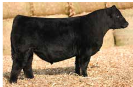
KLER GREATER GOOD 2064K | SEMEN $40 ASA: 4095999 OWNED WITH HEARTLAND SIMMENTALS, DENNING SIMMENTALS, SMALL FARMS