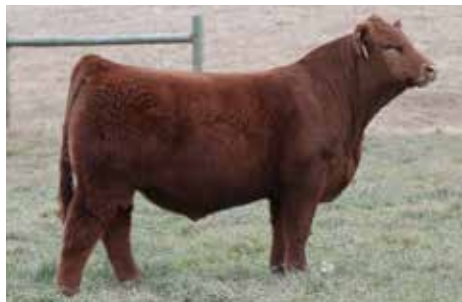
KLER BASIS 048J | ASA: 3939033 OWNED WITH RIVER POINT CATTLE CO., ONTARIO CANADA