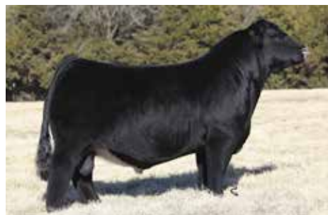
GEFF COUNTY O SIRE OF LOT 34

KLER/YFC Tomahawk L47 carries a stout, square hip, and shapely muscle in his quarter. A son of GEFF County O, who is known for adding phenotypic quality to his offspring. High quality cattle are not going out of style any time soon.