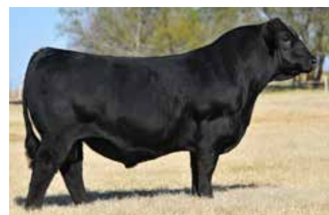
ES RIGHT TIME FA110-4 BREED INFLEUNCER AND SIRE OF LOT 11