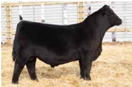
KLER PROMOTER G15 | ASA: 3613881 OWNED WITH SELECT Sires, ENGLISH OAKS SEMEN AVAILABLE AT SELECT Sires