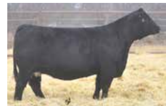
WS MISS SUGAR C4 MATERNAL GRANDDAM OF LOT 83

Due to calve 4/4/24 to KLER NATION 2087K (ASA: 4096021).