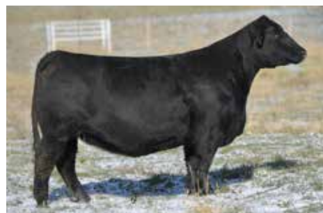
K-LER DOLLY'S QUEEN 609D ASA: 3133208