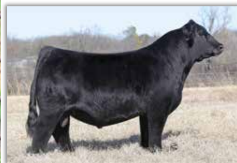
WHF/JS/CCS Double Up G365 Sire of Lots 42 – 44