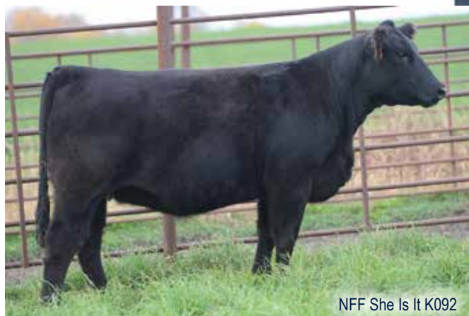
NFF She Is It K092

• DUE TO CALVE 3/1/24 WITH A BULL CALF BY OMF EPIC E27 (ASA: 3317371)