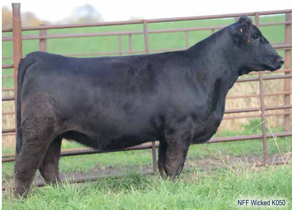
NFF Wicked K050