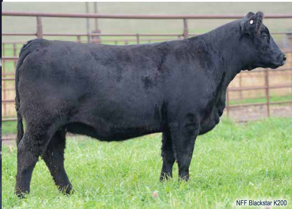
NFF Blackstar K200