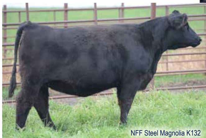
NFF Steel Magnolia K132

• DUE TO CALVE 3/29/24 TO CKCC MR RIGHT TIME 0674H (ASA: 3791593)