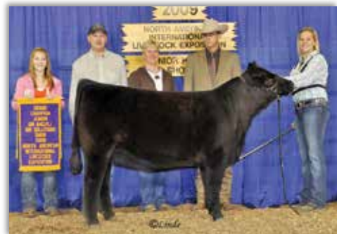
RCC-NFF Wicked Matriarch of the "Wicked" cow family!