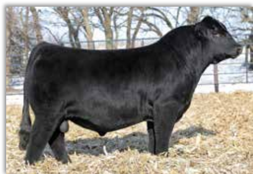
SO Remedy 7F – $530,000 Sire of Lots 32 & 33

• DUE TO CALVE 1/18/24 TO OMF EPIC E27 (ASA: 3317371)