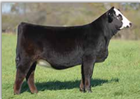
NFF Miss Design J234 Maternal Sister to Lots 1 & 2