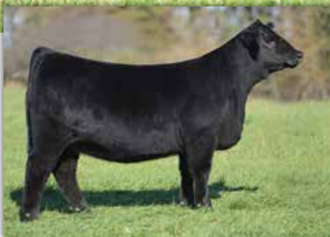
NFF Ellen J005 $19,000 Maternal Sister to Lot 48