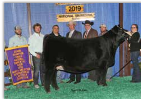
JBSF Breckyn 6F 2019 NAILE Grand Champion Purebred Simmental Heifer Daughter of the iconic Brooks Steel Magnolia X57