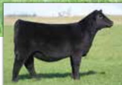
NFF Ellen J242 $22,000 Full Sister to Lots 49 & 50