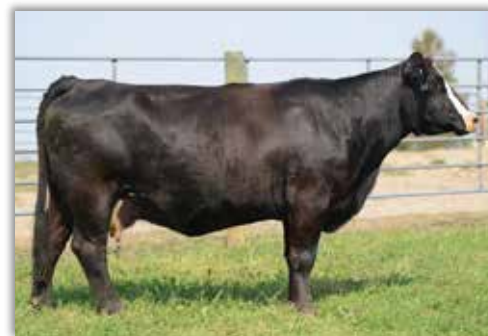
NFF Snowball Y062 – Dam of Lot 29