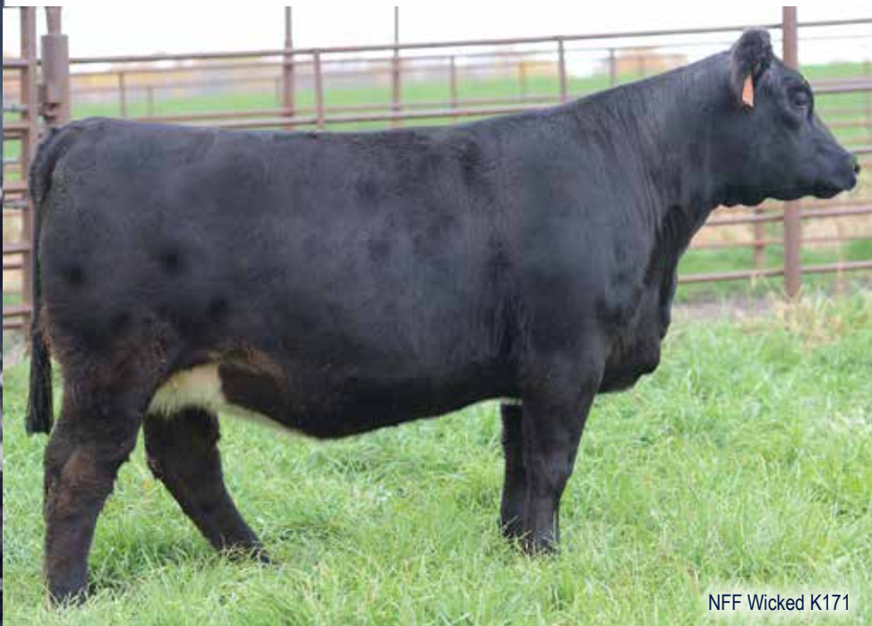
NFF Wicked K171