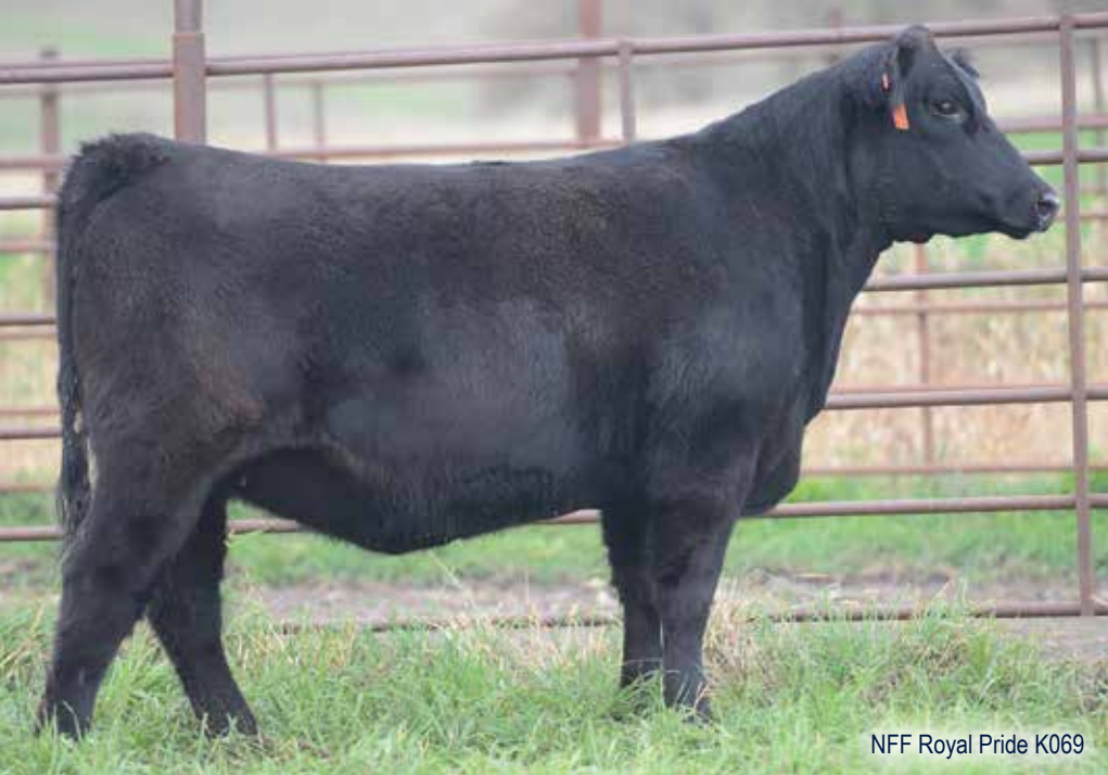
NFF Royal Pride K069