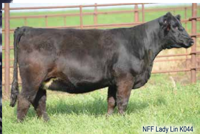
NFF Lady Lin K044

• DUE TO CALVE 1/18/24 TO OMF EPIC E27 (ASA: 3317371)