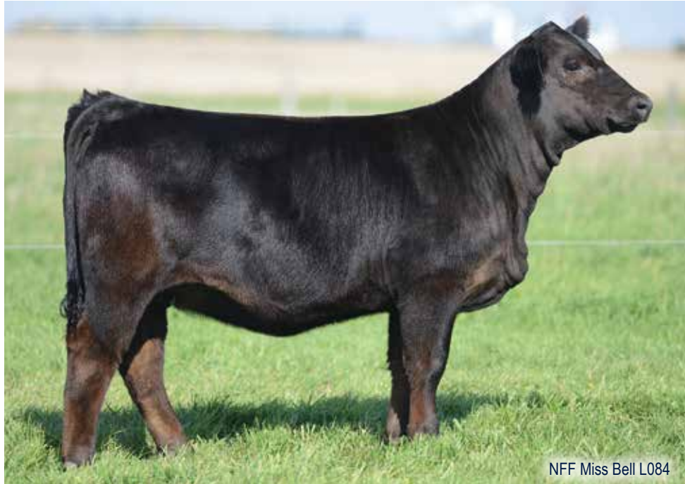
NFF Miss Bell L084