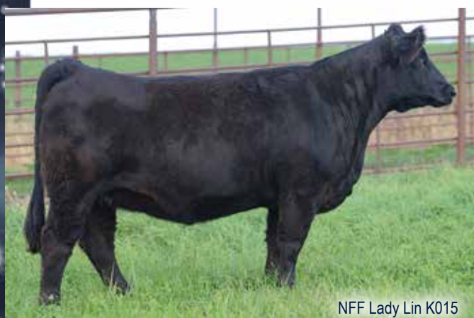
NFF Lady Lin K015

• DUE TO CALVE 3/1/24 WITH A HEIFER CALF BY OMF EPIC E27 (ASA: 3317371)