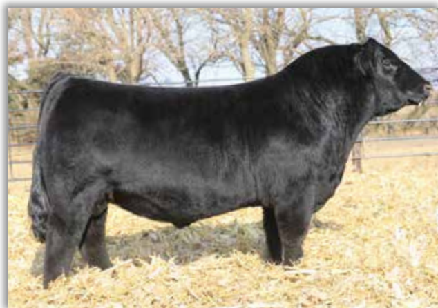
EC Rebel 156F – $200,000 Sire of Lot 29

• DUE TO CALVE 3/24/24 TO CKCC MR RIGHT TIME 0674H (ASA: 3791593)