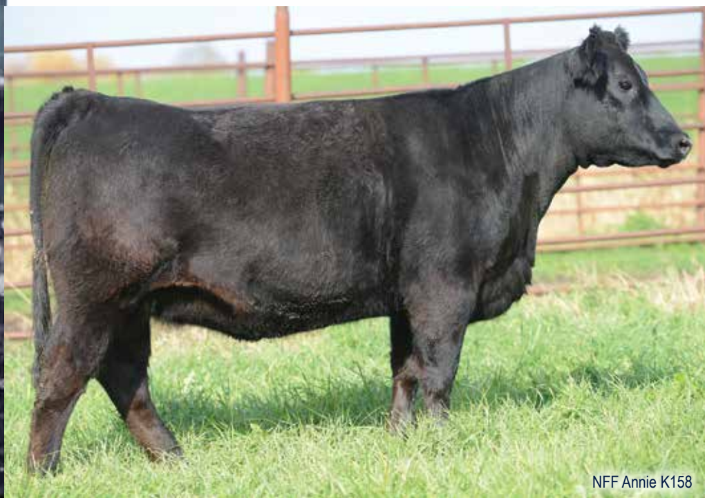
NFF Annie K158