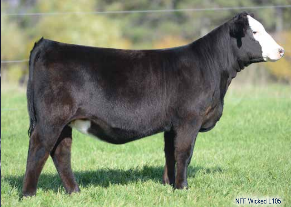
NFF Wicked L105