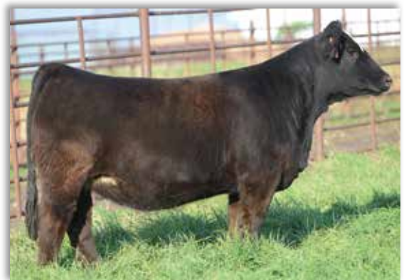
NFF Wicked K238