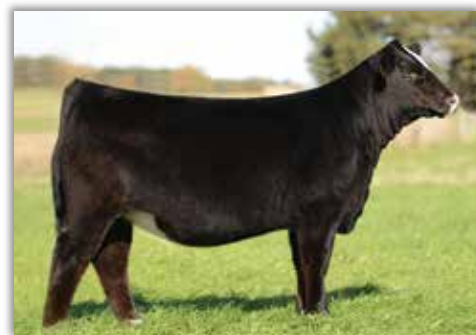
NFF Snowball G251 Maternal Sister to the Dams of Lots 8 & 9