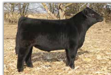
CCLT Alliance 91C Paternal Grandsire of Lots 35 – 38