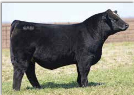
Wheatland Bull 954G – Sire of Lot 13