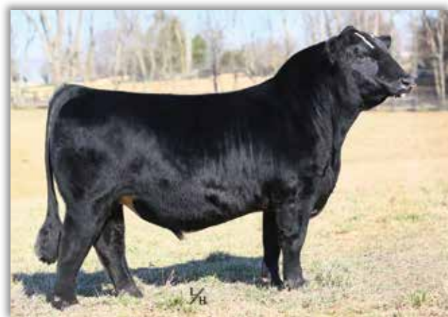
CCS/WHF Ol'Son 48F – Sire of Lots 40 & 41