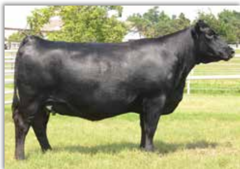
C&C Winnie 2048 Matriarch of the "Winnie" cow family!