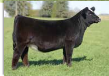
NFF Wicked J208 $33,000 Maternal Sister to Lot 3