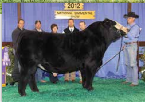
MR HOC Broker Triple Crown Winning Sire of Lot 48