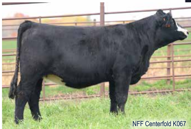
NFF Centerfold K067

• DUE TO CALVE 4/8/24 TO CKCC MR RIGHT TIME 0674H (ASA: 3791593)