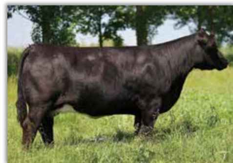
Rhythm 418P Iconic Maternal Granddam of Lot 11