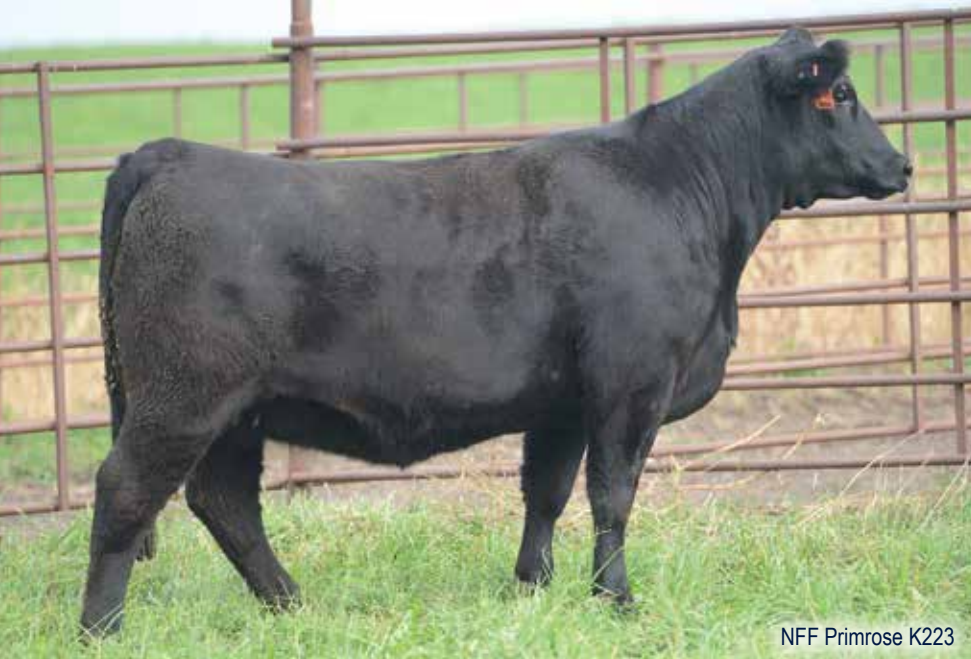
NFF Primrose K223