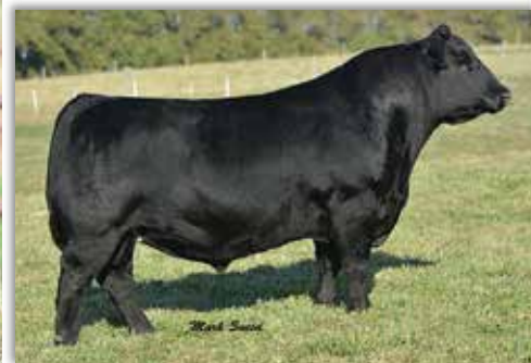
PVF Insight 0129 – Sire of Lot 55