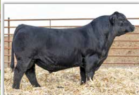
OMF Epic E27 — Service sire to countless females throughout the offering!