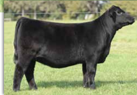
NFF Ellen K002 – $10,000 Full Sister to Lot 15