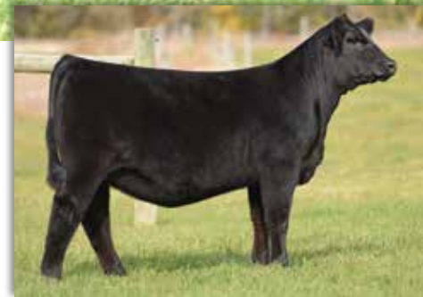
NFF Ellen K070 – Maternal Sister to Lot 48