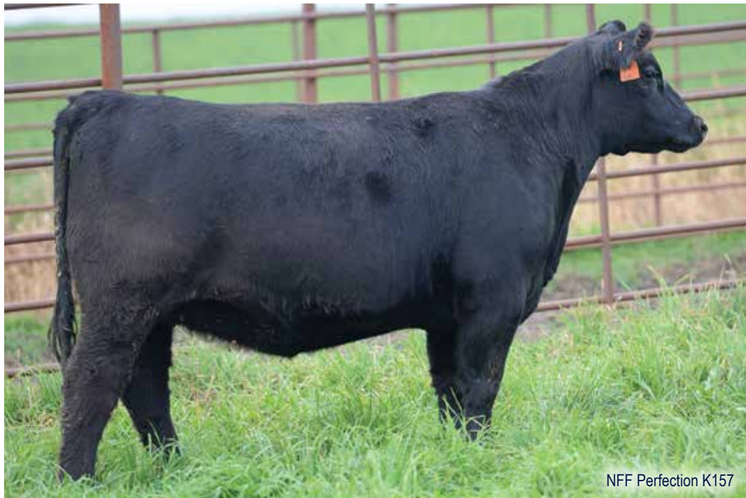
NFF Perfection K157