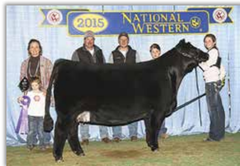
Mindemann Blacklass A24 – Dam of Lot 39