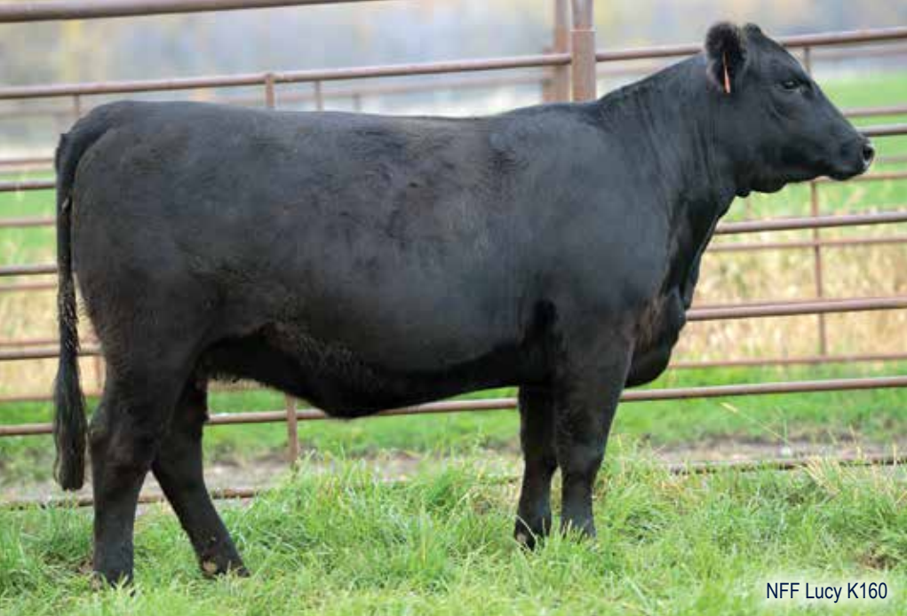
NFF Lucy K160