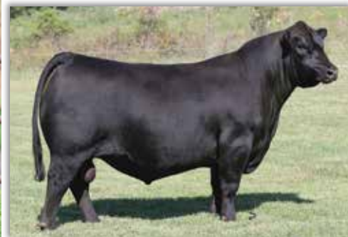
Stevenson Turning Point – Sire of Lot 56