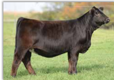
NFF Miss Design K201 $9,000 Maternal Sister to Lots 1 & 2