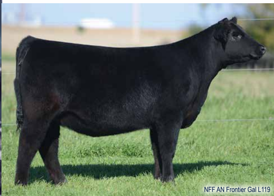
NFF AN Frontier Gal L119