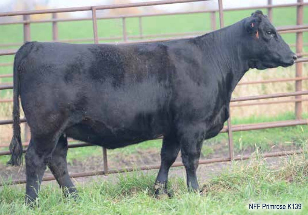
NFF Primrose K139