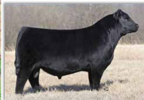
Century Headliner 89 – Sire of Lots 53 & 54