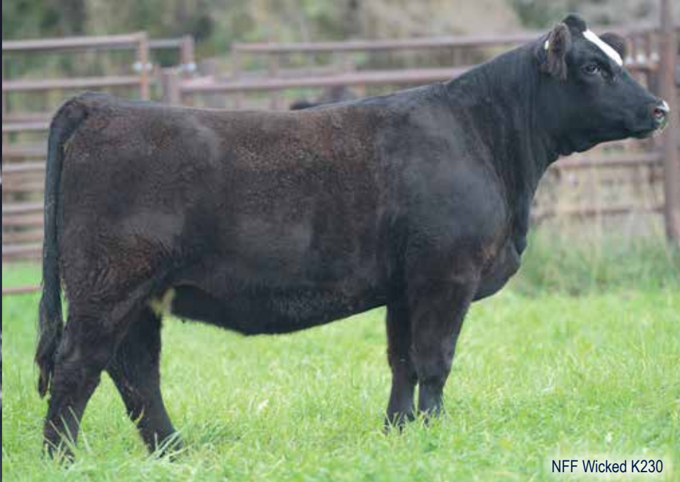
NFF Wicked K230