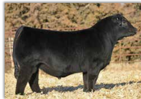
FRKG CKCC Platinum 009H ET $175,000 Sire of Lot 5