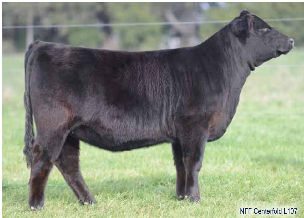
NFF Centerfold L107