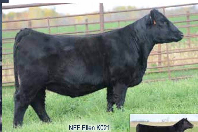
NFF Ellen K021