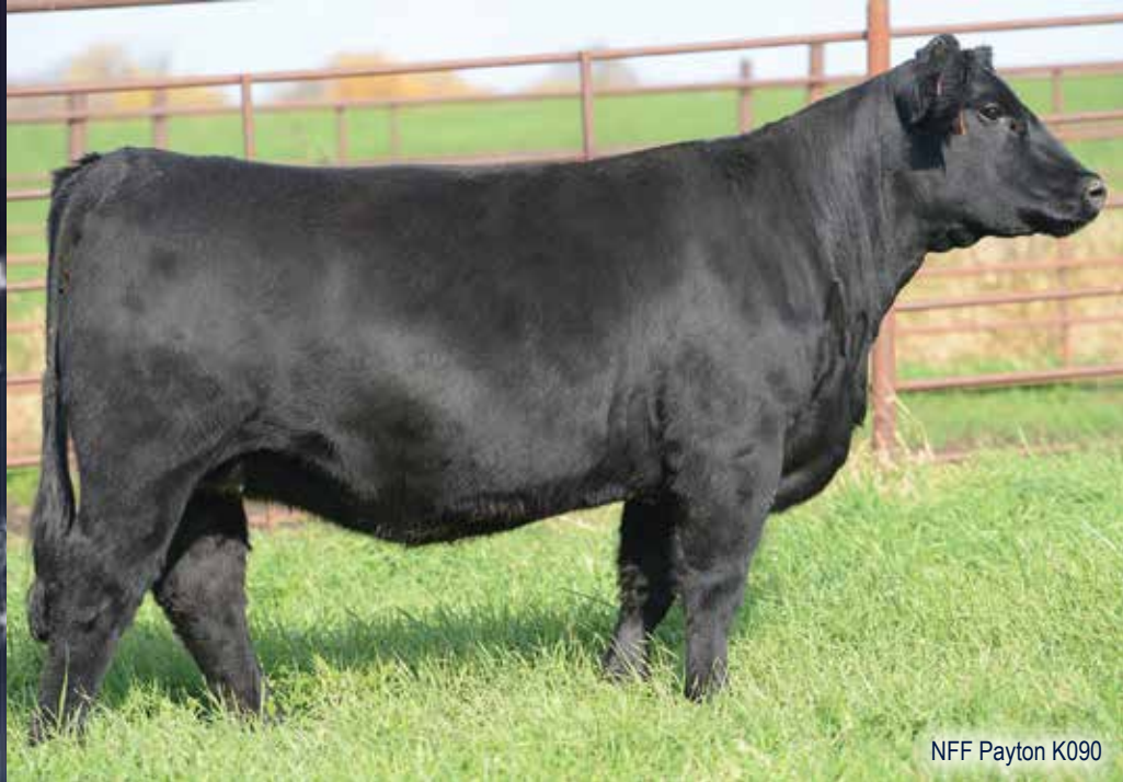
NFF Payton K090