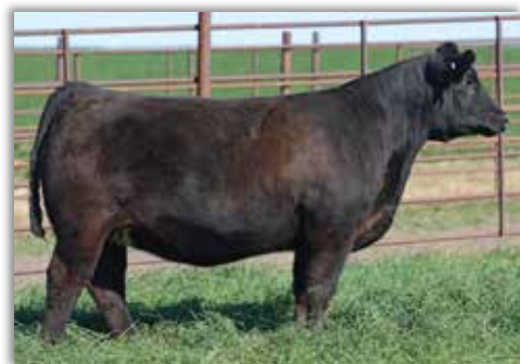
NFF Wicked J097 3/4 Sister in Blood to Dam of Lot 6