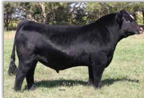
Mr CCF 20-20 – $100,000 Sire of Lot 39