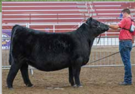
NFF Ellen K025 2023 Aksarben Res. Grand Champion Angus Heifer