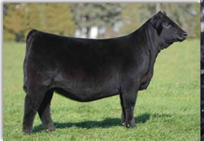
NFF Ellen J089 - $8,000 Full Sister to Lots 16 & 17

L038 is the next daughter from the famed NFF T/R Ellen F181. She is the first of two daughters sired by Gateway Follow Me F163, the popular and proven Angus herd sire that continues to see heavy use across the country! NFF Ellen L038 is beautiful profiling female that offers the extra stoutness of foot and bone, without sacrificing her ultra-feminine and refined look about her front third. We have always loved the surplus of volume and capacity that she brings to the equation, while still maintaining more than enough power and shape from behind. She is sound built, loose spined, and sets to the surface with confidence. A full sister to L038, NFF Ellen J089, commanded $37,500 in 2021 to Udell Cattle Company. A true highlight in this year's offering that has as much genetic relevance and upside as any. L038 is the type of female that you can build a program around!