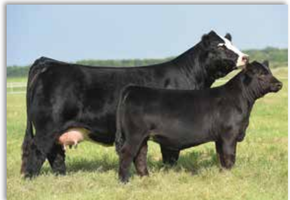
WAGR Chanel 5073C Paternal Granddam of Lots 6 & 7