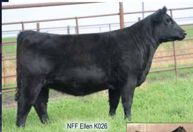
NFF Ellen K026