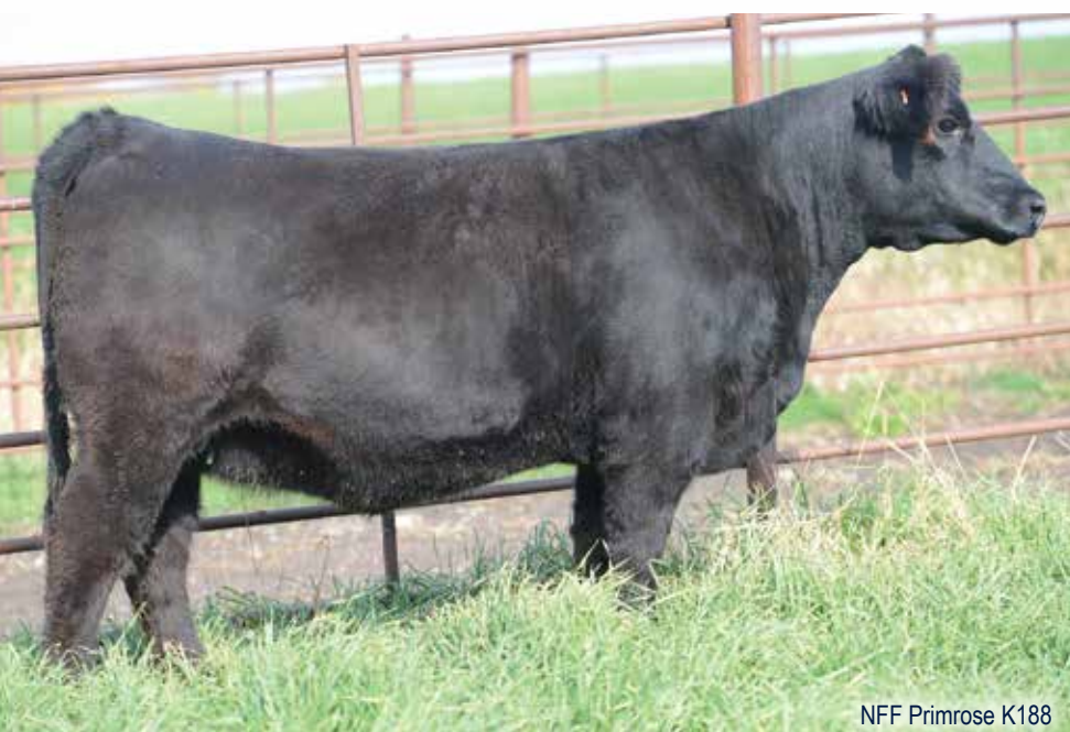
NFF Primrose K188