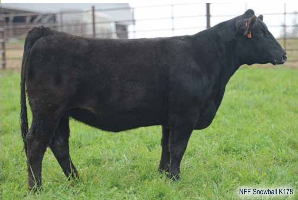
NFF Snowball K178