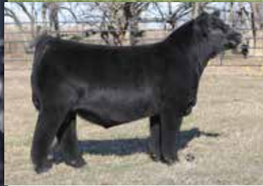
STCC Tecumseh 058J $620,000 Sire of Lot 3