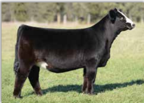
NFF Miss Design H036 $20,750 Maternal Sister to Lots 1 & 2