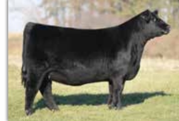
NFF WB Frontier Gal G244 Dam of Lots 19 & 20