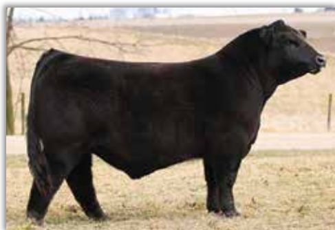
ZKCC Easy Rider 601D Paternal Grandsire of Lot 25