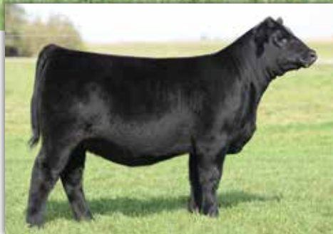
NFF Ellen K017 – $11,000 Full Sister to Lot 15