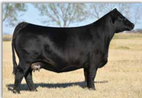
NFF Wicked B125 Famous member of the "Wicked" cow family!