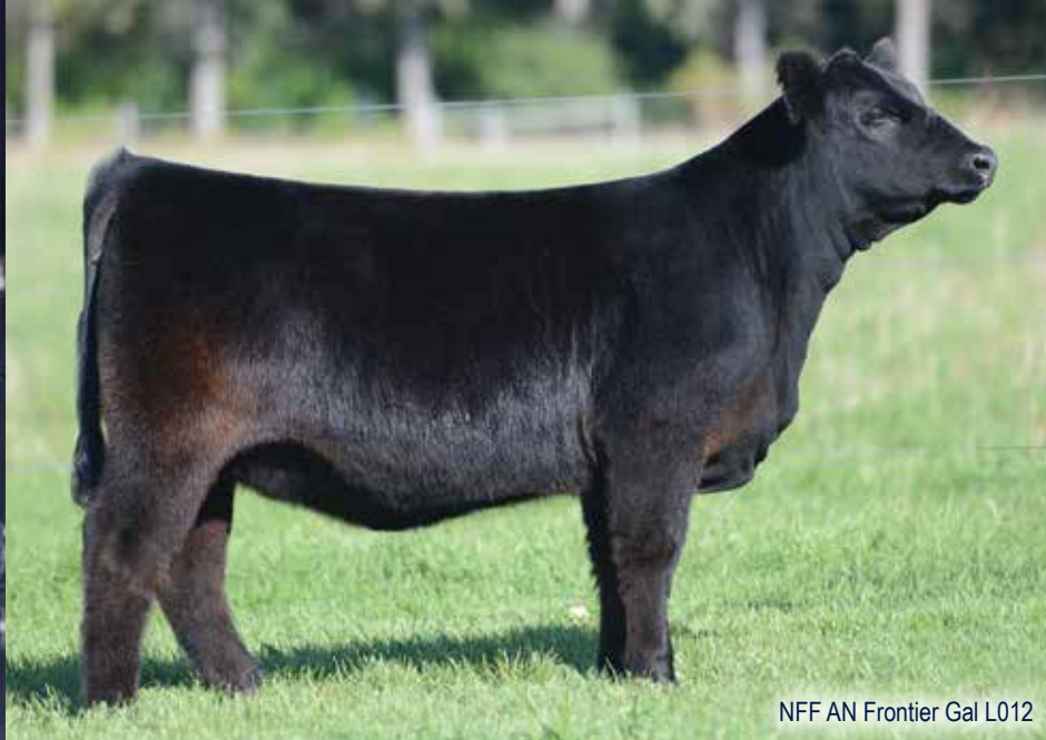
NFF AN Frontier Gal L012