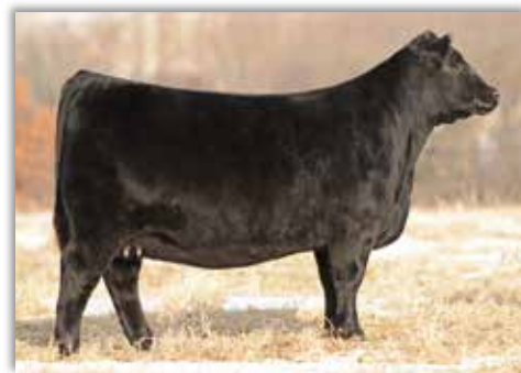
NFF T/R Ellen F181 – Dam of Lots 15 – 17

The lone half-blood female in the open division is supported by an elite pedigree to say the very least! NFF Ellen L008 is sired by the $620,000 world record high selling STCC Tecumseh 058J and backed the cornerstone female in our donor pen, PVF Ellen 405. This January show heifer prospect has the basic build, phenotype, and genetic power to be an absolute dominant force in the show ring and in production! Her dam is one of the highest dollar generating females in our program, only rivaled by a maternal sister to L008, NFF T/R Ellen F181! F181 is the 2019 NJAS Division V Junior Champion for the Mayer family. She has followed in her mother's footsteps, producing countless high sellers and show ring champions. It has always been our goal to incorporate genetics from PVF Ellen 405 into our SimGenetic breeding program to add another dimension to the genetic consistency and quality of the females that we produce. We truly believe that the influence of 405 will be everlasting as we continue to breed these SimGenetic females toward Purebred status. Here is your chance to get in on the ground floor of the future of Nelson Family Farms!