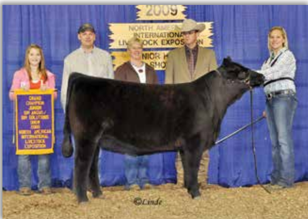
RCC-NFF Wicked – Matriarch of the “Wicked” cow family!