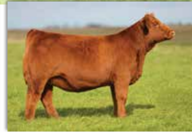
NFF Wicked G177 Maternal Sister to Lot 3