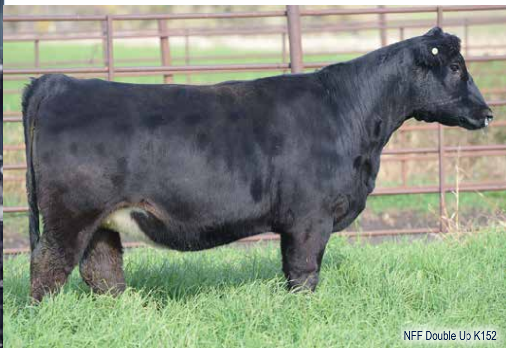
NFF Double Up K152