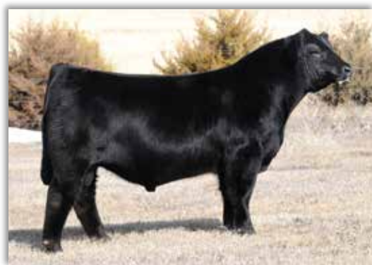
W/C Relentless 32C – Sire of Lots 27 & 28