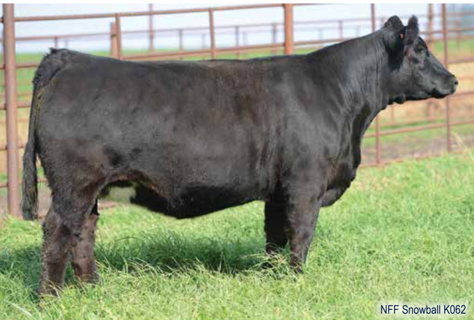
NFF Snowball K062