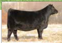
NFF T/R Ellen F181 Dam of Lots 49 & 50