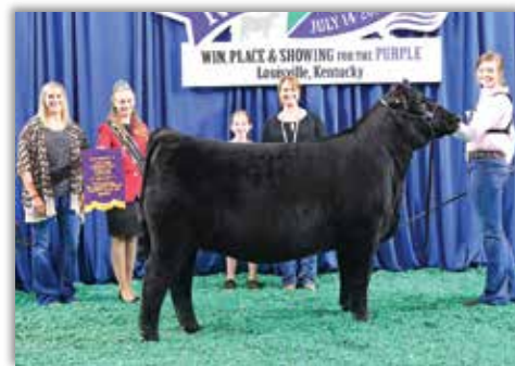
NFF T/R Ellen F181 2019 NJAS Division V Junior Champion Angus Heifer & Dam of Lots 15 – 17