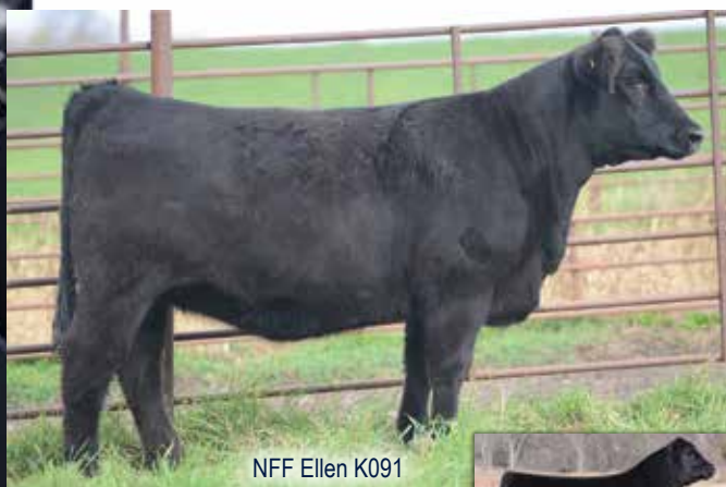
NFF Ellen K091