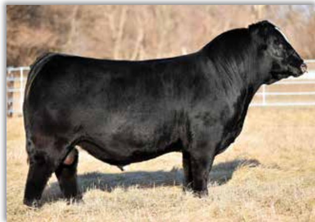
JBSF Berwick 41F – Sire of Lot 21

• DUE TO CALVE 2/12/24 WITH A BULL CALF BY CKCC MR RIGHT TIME 0674H (ASA: 3791593)