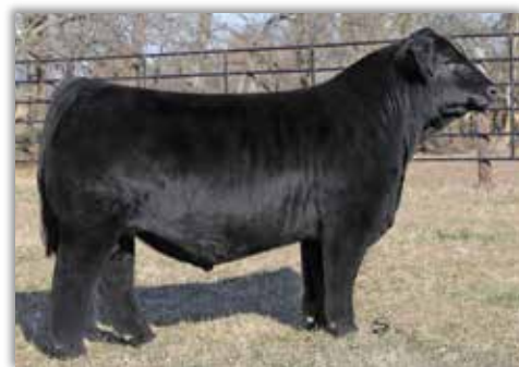
FRKG Victory 78J – $210,000 Sire of Lot 8