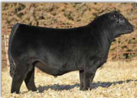
FRKG CKCC Platinum 009H ET $175,000 Sire of Lot 12