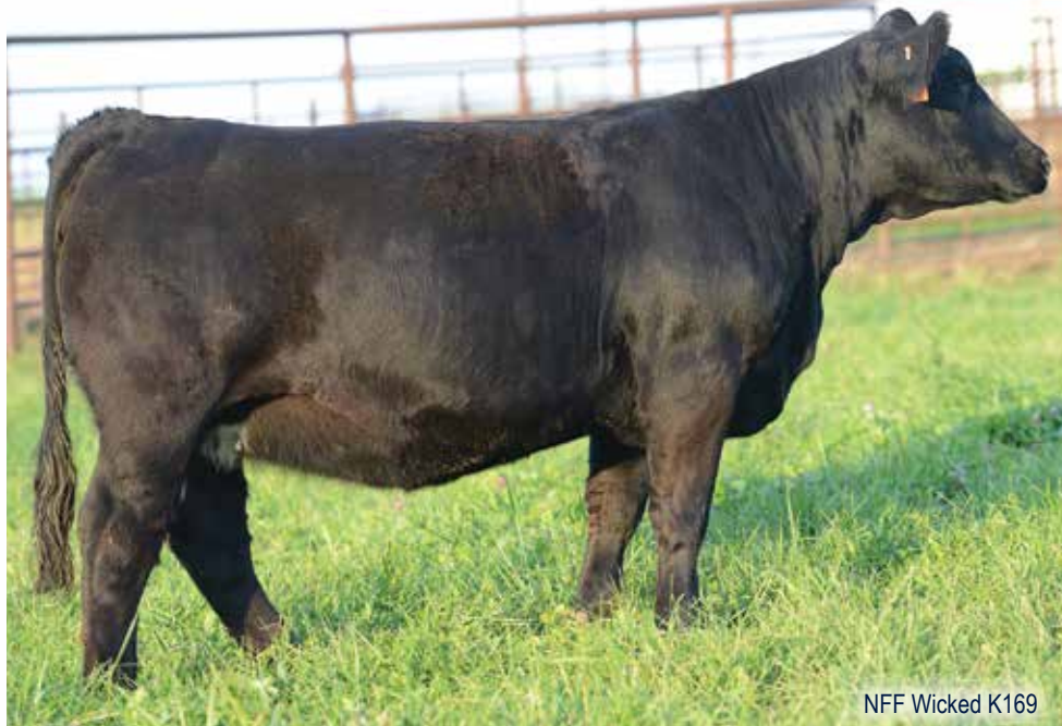
NFF Wicked K169