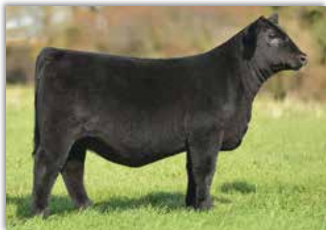
NFF WB Winnie G273 – Dam of Lot 18