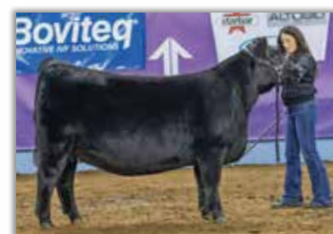
WB Frontier Gal 009 2022 Cattleman's Congress Res. Division Champion & Maternal Sister to Dam of Lots 19 & 20