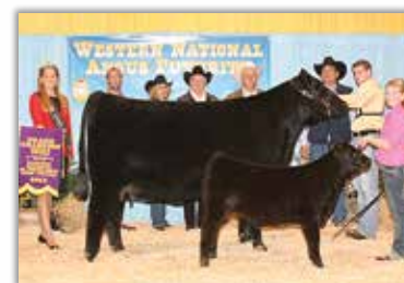
EXAR Frontier Gal 1405 Famous 3rd Generation Maternal Dam of Lots 19 & 20