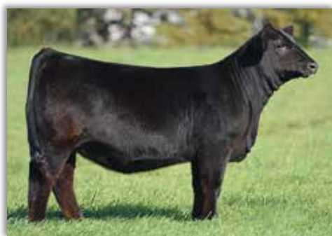
NFF Snowball J158 Full Sister to the Dams of Lots 8 & 9