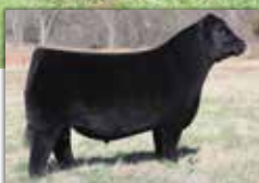
Gateway Follow Me F163 Sire of Lots 51 & 52