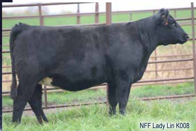
NFF Lady Lin K008