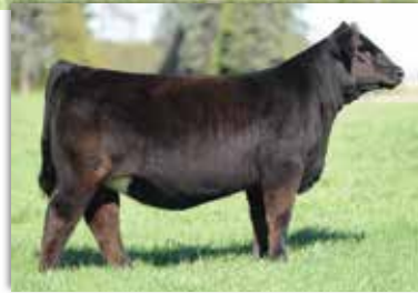
NFF Wicked J125 $21,000 Maternal Sister to Lot 3