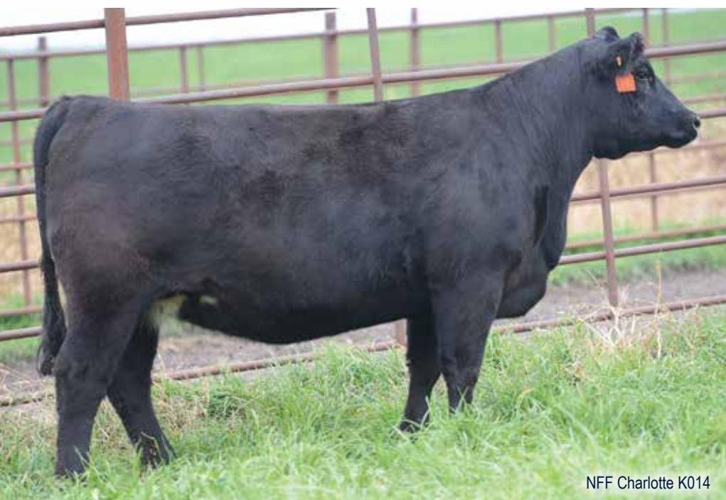
NFF Charlotte K014