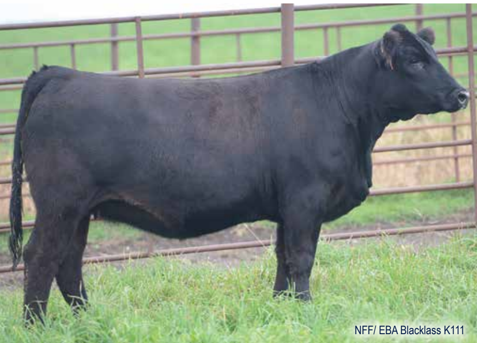
NFF/ EBA Blacklass K111