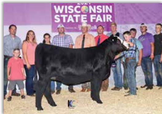
NFF Princess H189 2021 WI State Fair 5th Overall Junior Breeding Heifer Maternal Sister to Lots 27 & 28