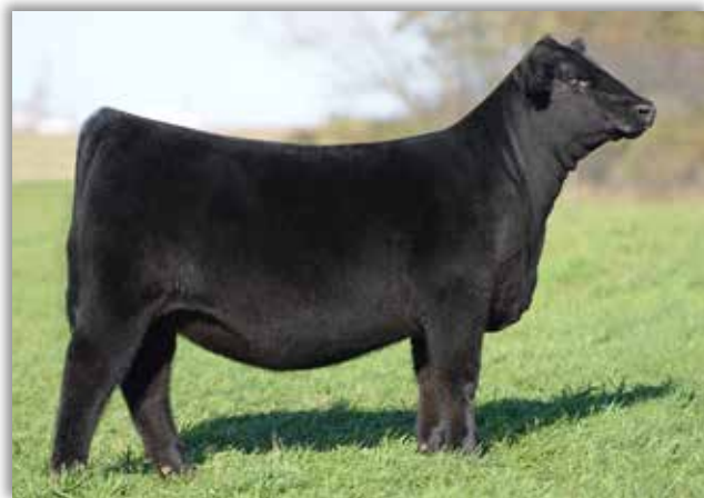
NFF Ellen J132 - $37,500 Full Sister to Lots 16 & 17

NFF Ellen L148 is the younger sister from the Gateway Follow Me F163 x NFF T/R Ellen F181 mating. This February born show heifer prospect has been blessed with a captivating presence from the side. She is so sleek and elegant about her front third as she ties high at the topside of her blade and remains bold and three-dimensional from that point back. She is long and square hipped, wide pinned, and stout featured. There is no doubt that this female will have many fans on sale day. She reminds us as much of her dam as possibly any other daughter we have ever offered to date. Study the angles, her joints, and the way that this female is designed... she will be an absolute force when it counts the most!