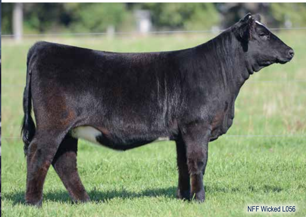
NFF Wicked L056