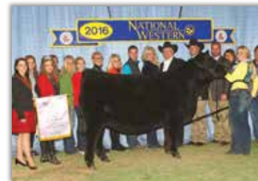
EXAR Frontier Gal 4865 2016 NWSS Reserve Grand Champion Angus Heifer & Full Sib to Maternal Granddam of Lots 19 & 20