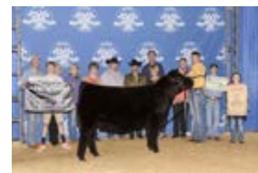
2015 OYE SUPREME CHAMPION PUREBRED JUNIOR BREEDING HEIFER 3/4 SISTER TO DAM OF LOT 29