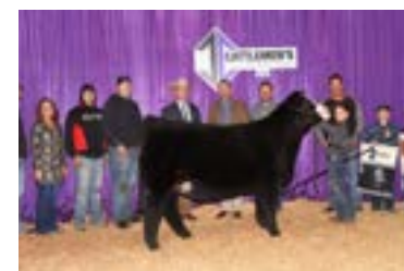
WEIS LILLY 35J 2023 CATTLEMEN'S CONGRESS GRAND CHAMPION PUREBRED SIMMENTAL HEIFER & MATERNAL SISTER TO DAM OF LOT 25