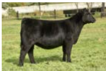
TNRC WEIS LINDA 4L $20,000 MATERNAL SISTER TO DAM OF LOT 28