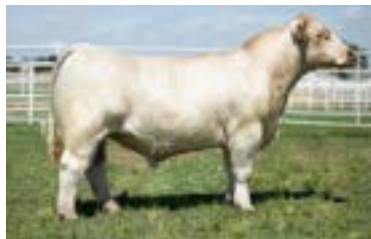
HOLY GHOST SIRE OF LOT 8

BREED LOW CHIANINA · ACA 419068 · DOB 5/22/23 · OFFERED BY WEIS