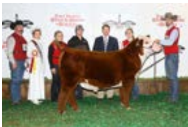
FTZS DIGNIFIED I04J 2022 FWSS RESERVE GRAND CHAMPION POLLED HEREFORD BULL