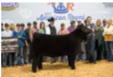
2017 AMERICAN ROYAL RESERVE GRAND CHAMPION MARKET STEER

2014 NWSS GRAND CHAMPION MAINTAINER HEIFER & MATERNAL GRANDDAM OF LOT 18