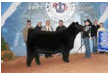
DUNK FTZS FRANNY 227K ET

2023 AMERICAN ROYAL GRAND CHAMPION MAINTAINER BULL & MATERNAL BROTHER TO LOT 12