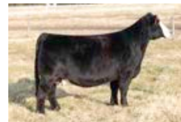
JPLF/RBS YOUR THE ONE MATERNAL GRANDDAM OF LOT 25