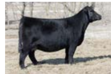
WEIS MISS NALA 401H DAM OF LOT 25

The JPLF/RBS You're The One "Rudy" cow family is one of the original cornerstones of the Weis program, and many of the Simmental genetics marketed through St. Ansgar tie back to this potent genetic source of maternal and phenotypic excellence. This granddaughter of Rudy that is sired by WHF/JS/CCS Double Up G365 is genuine from the ground up, she is built as square and true as any in the offering. She is elegant about her front third, offering a maternal look of femininity about her head and neck. She is sensible in her frame size, robust about her rib cage, and as square pinned and smooth muscled as you can design one from this particular sire group. It would be amiss not to mention that the way that she handles her topline on the move and lays her tailhead in is near perfect. This is a cow family that personifies flash and function, we think that she will make for a wise investment once she enters production, and her \frac{3}{4} blood status opens up the door to generating cattle of purebred status.