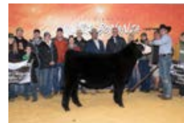
JSN FTZS AMANDA IOIK MANY TIME CHAMPION & FULL SISTER TO LOT 29