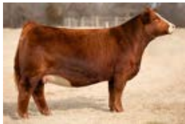
CAMPBELLCO ZINFANDEL 12G DAM OF LOT 30

BREED 1/2 SIMMENTAL · ASA 4268687 · DOB 4/23/23 · OFFERED BY FITZ