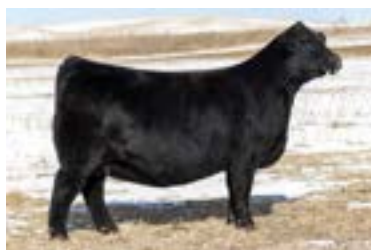
CELL 5600C "LINDA" MATERNAL GRANDDAM OF LOT 28