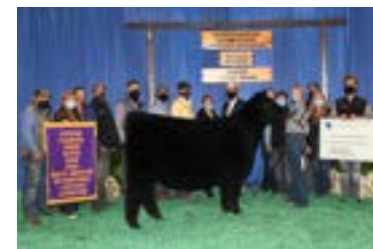
JSUL WHO DAT DARLING 902G ET 2020 NAILE SUPREME CHAMPION JUNIOR BREEDING HEIFER & FULL SISTER TO LOT 9