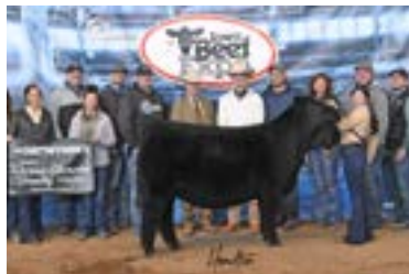
JPLF QUEEN RUTH J103

BREED ANGUS · AAA 20757448 · DOB 4/19/23 · OFFERED BY WEIS