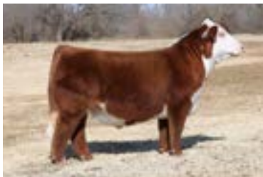
FTZS DIGNIFIED I04J MATERNAL BROTHER TO LOT 6

BREED HORNED HEREFORD • AHA 44505476 • DOB 6/8/23 • OFFERED BY FITZ