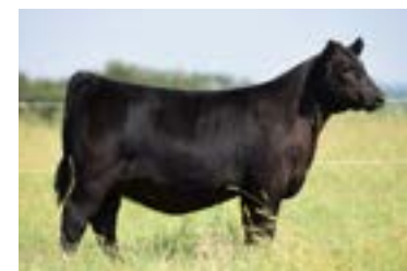
J&J QUEEN 517 FULL SISTER TO DAM OF LOT 29