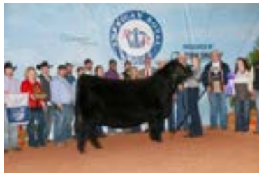
JSUL OH BOY REBA 0267G

BREED 3/4 SIMMENTAL · ASA 4271865 · DOB 4/2/23 · OFFERED BY FITZ