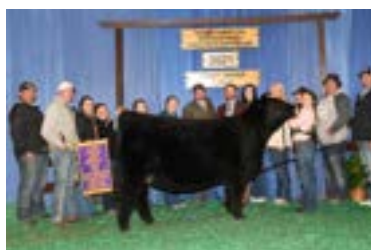
CCS/JS SUMMER 33H 2021 NAILE GRAND CHAMPION SIMMENTAL HEIFER & MATERNAL SISTER TO DAM OF LOT 24