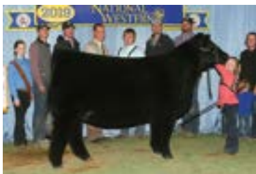
WLFF MISS FRAN 37E