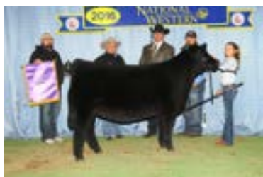
DAF REBA C85