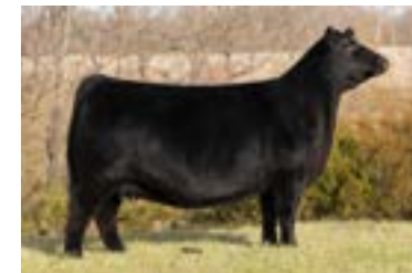
UDE QUEEN RUTH 9088 "BECKY" DAM OF LOTS 1 & 2