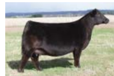
J6C WEIS MISS COCO 16F DAM OF LOT 21 & 22