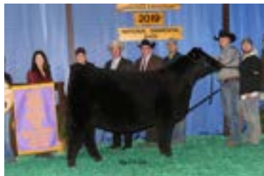
J6C WEIS MISS COCO 16F

BREED PB SIMMENTAL · ASA 4268712 · DOB 6/3/23 · OFFERED BY WEIS