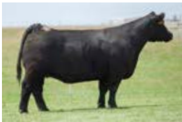
JSUL DREAMS COME TRUE 846U "KELLI" FULL SISTER TO DAM OF LOT 10

BREED CHIANINA · ACA 419682 · DOB 4/15/23 · OFFERED BY FITZ