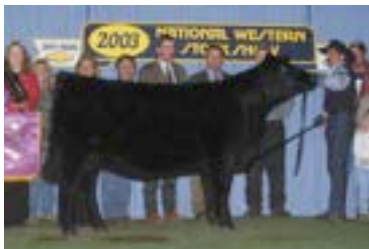
GREENS PRINCESS 1012 LEGENDARY $400,000 VALUATION 4TH GENERATION DAM OF LOT 4

BREED ANGUS • AAA 20768656 • DOB 4/22/23 • OFFERED BY WEIS