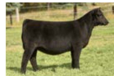
LASHMETT/WEIS QUEEN RUTH L344 FULL SISTER TO LOT 1