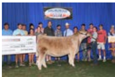
2021 IA STATE FAIR GRAND CHAMPION MARKET HEIFER PRODUCT OF THE "LEXI" COW FAMILY!