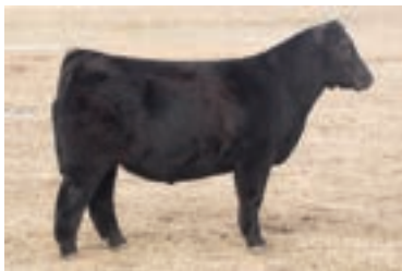
WEIS ALL ME 10F SIRE OF LOTS 14-16

BREED HIGH MAINE • AMAA 545214 • DOB 5/10/23 • OFFERED BY FITZ