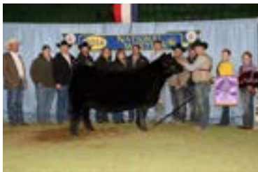
MISS WHISKEY DREAMS 30Z "2/75"

BREED MAINTAINER • AMAA 545841 • DOB 6/2/23 • OFFERED BY FITZ