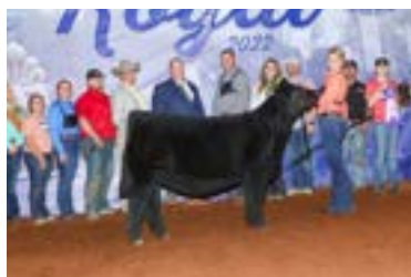
JSUL TSSC LADY IN BLACK 2181K 2022 & 2023 AMERICAN ROYAL RESERVE GRAND CHAMPION PUREBRED SIMMENTAL HEIFER & FULL SISTER TO LOT 20