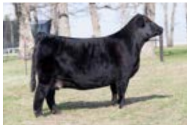
CURTINS LINDA 6J "AUTUMN" DAM OF LOT 28

BREED 1/2 SIMMENTAL · ASA 4276333 · DOB 5/26/23 · OFFERED BY WEIS