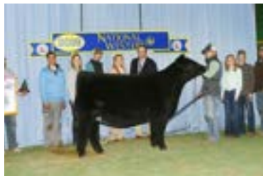
PEINE/GS ROSIE 677D DAM OF LOT 20

BREED PB SIMMENTAL · ASA 4271869 · DOB 4/26/23 · OFFERED BY FITZ