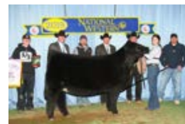
STELLA 08E "TINK" 2019 NWSS RESERVE GRAND CHAMPION PUREBRED SIMMENTAL HEIFER & MATERNAL SISTER TO DAM OF LOT 25