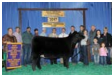
WHF SUMMER 365C DAM OF LOT 24

BREED PB SIMMENTAL • ASA 4250077 • DOB 4/22/23 • OFFERED BY WEIS