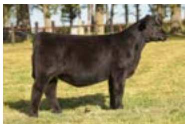
LASHMETT/WEIS QUEEN RUTH K222

2022 IA BEEF EXPO RESERVE SUPREME CHAMPION BREEDING HEIFER & FULL SISTER TO LOT 2