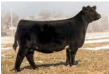
KANES MACY ET "NIKKI" DAM OF LOT 16

BREED MAINTAINER • AMAA 543614 • DOB 5/18/23 • OFFERED BY WEIS