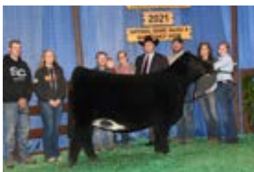
KANES AB ET 2021 NAILE GRAND CHAMPION MAINTAINER HEIFER & FULL SISTER TO DAM OF LOTS 15 & 16