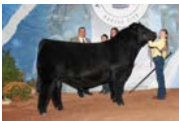
DUNK FRANCISCO 201K ET

2019 NWSS RESERVE GRAND CHAMPION MAINTANER HEIFER & DAM OF LOT 12