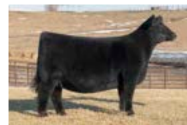
JSUL WHO DAT CAT 7184E ET FULL SISTER TO DAM OF LOT 9