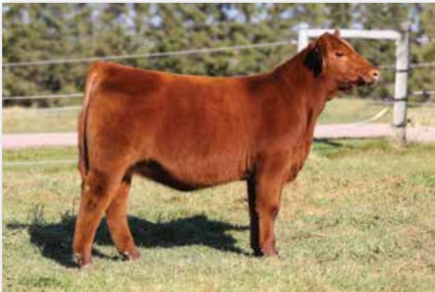
TC SUGAR K78 - $16,500 Full Sister to Lots 7-9