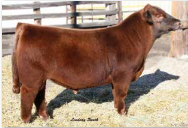
WEBR TC CARD SHARK 1015 - Sire of Lot 23 & Paternal Grandsire of Lot 24