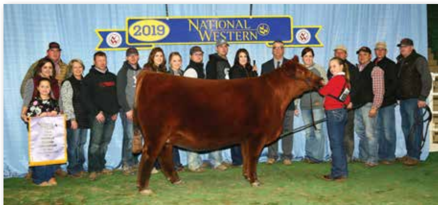
MEADO-WEST TC HANNAH - Maternal Granddam of Lots 21 & 23