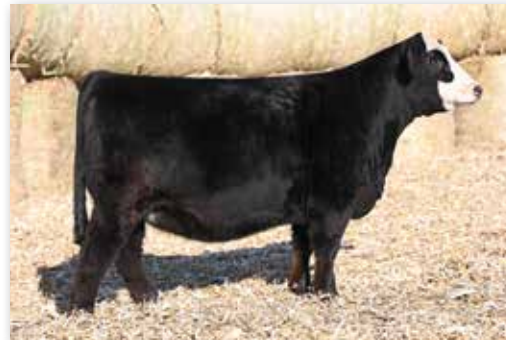
JWC 7114 ANGEL 114J - Full Sister to the Dam of Lot 26

The second of the pair of SO Remedy 7F Purebred Simmental show heifers is a daughter of W/C Chica Linda 0201H, 0201H is a W/C Bankroll 811D daughter from the W/C Angel 7114E matron, one of the leading ladies for Jared Werning. We love the outlier feature and unconventional pieces that this female is built with, she has inherited the special features that have always made the Angel cow family one we have admired. Find this one to inspect her extra massive, boldy sprung ribcage, her extra degree of bone circumference and foot size, along with added hair quality and neck extension, properties that propel her to the top of many peoples lists.