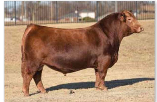
TC TUCKER 65J - Sire of Lot 4

TC Ellie 84L is a standout in this offering, the first group of TC Tucker 65J progeny have us excited for what he can do going forward. This late March female is so long necked, massive sided, rugged boned and angular, she has been high on the list of favorites from day one because we just aren't sure where to fix her. She is soft haired and chiseled jawed, and carrying the most iconic family name to ever come out of our program, we don't know what else we could do to impress you than sorting this one to the sale pen, she is some of the best we can offer in terms of pedigree and phenotype.