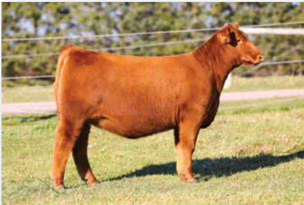
TC ELLIE 07K - $15,500 Full Sister to Lot 5