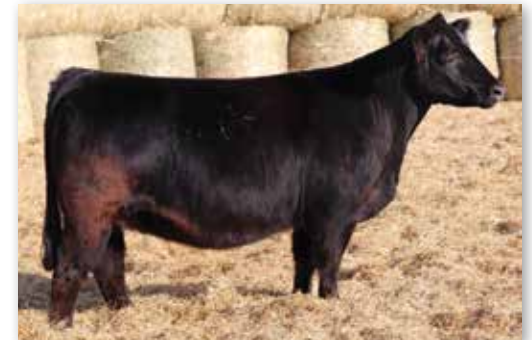
W/C ANGEL 7114E - Maternal Granddam of Lot 26