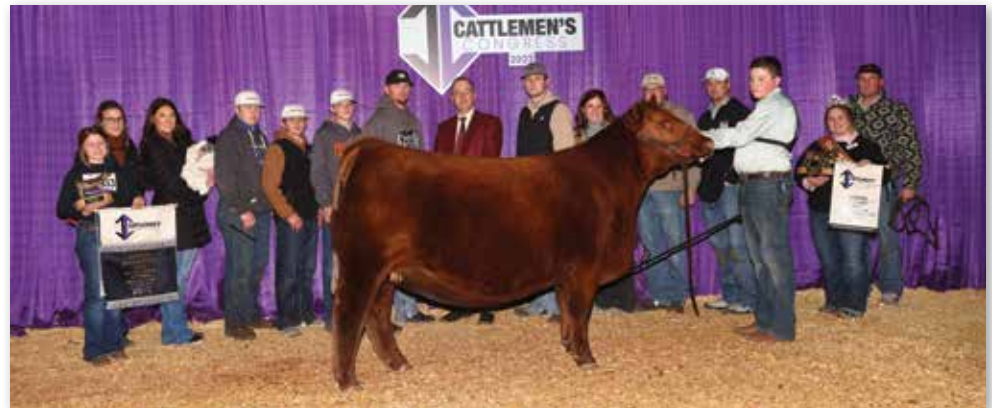
TC FANCY 09J - Maternal Sister to Lot 16

We are excited to introduce the premiere of J2R Resource 144J daughter's to Visions in Red, this is a sire group that you are going to be seeing a lot more of in the future, because we think he represents the next generation of phenotypic excellence for our program. The heritability of her phenotype though comes from either side of her pedigree, 100L is a maternal sister to TC Fancy 09J, Tucker's Grand Champion Female in the Junior Show and Reserve Champion Female in the Open show at this past years Cattleman's Congress. Their mother, FSR Leta 135A has proven to be a potent producer, and has proved again that her daughters are consistently blessed with an authentic and enviable structural build, and an outline that leaves nothing further to be desired. If you cannot already tell, we think a lot about the maternal base that supports this one. Retaining 50% embryo interest.