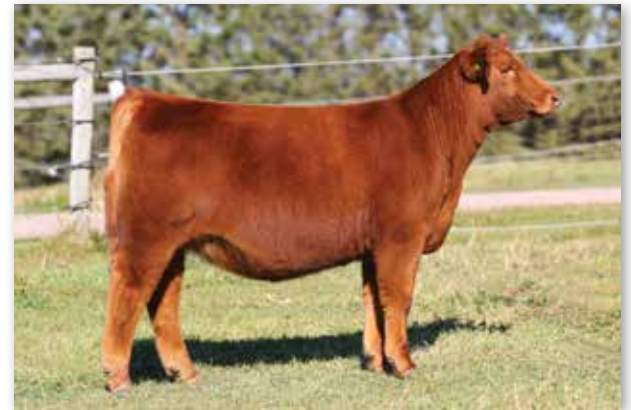
TC ELLIE 50K - $10,000 Full Sister to Lots 2 & 3