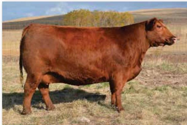
RED SIX MILE LAKOTO 35W - Maternal Granddam of Lot 15

This third EGL GCC Red Eagle E7194 daughter is ultra-functional and extra dense in her construction, and out of a standout Red U-2 Reckoning 149A cow that is a maternal sister to Six Mile Game Face 164Y being out of the legendary Red Six Mile Lakoto 35W. The composition of the middle third of her body is bold and deep, and the structural integrity that forms her foundations is flexible and effortless. She comes with a preferable toned hide color, and balances with symmetry from the profile.