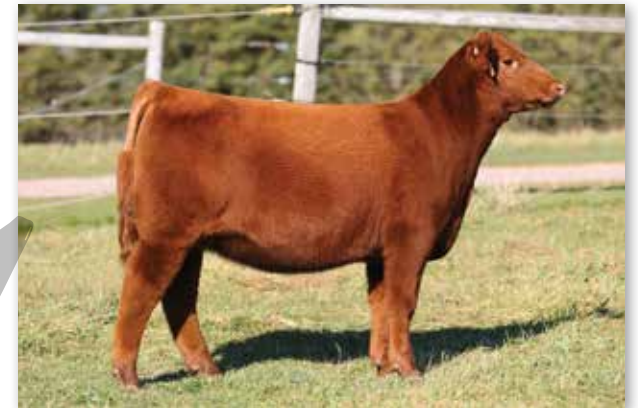
TC SUGAR K7 - $31,000 Maternal Sister to Lots 7-9 & Full Sister to Lot 10

TC Sugar L521 is one that catches a gear every day, as we approach sale time she continues to bloom in her shape and composition. She does all the intangibles so right, and has a structural build that will support her all the way through her gleaming show career. The TC Sugarcup 02Y cow family is quickly steaming towards legendary status, and has proven to be a foolproof lineage for generating show heifers because of their beautiful look and balance, so trust in the process here and be a part of the story L521 is destined for.