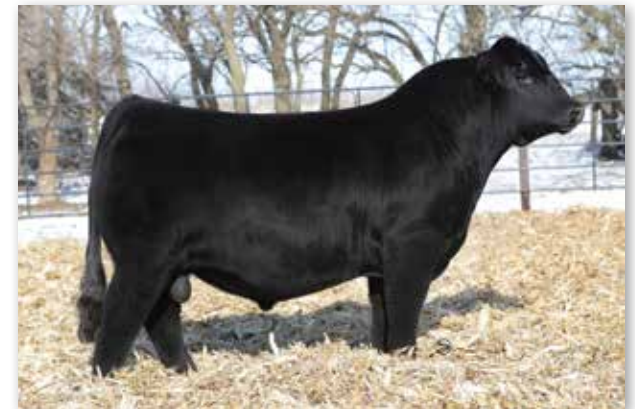
SO REMEDY 7F - Sire of Lot 25 & 26

We begin the Simmental division with a purebred female that we think is pretty special. A direct daughter of the $530,000 SO Remedy 7F, who after his first two calf crops relegated any doubt about the legacy he was destined to build, his progeny are winning banners on the nation's largest stages, and are at the top of high seller's lists. Both the Champion and Reserve Purebred Females at the 2023 American Royal were daughters of SO Remedy 7F. We knew that this cross with Miss Coco 16F was going to align the stars phenotypically, and we think 395L looks a lot like her mother did at this stage. Her mother was Reserve Champion Purebred Simmental Female both at the North American and the NWSS, and Supreme Champion Female at the Minnesota Beef Expo. The striking looks of this middle of May born heifer calf will be what catches your initial attention but upon further inspection you will like the flawless structure and captious middle third that she's built with.