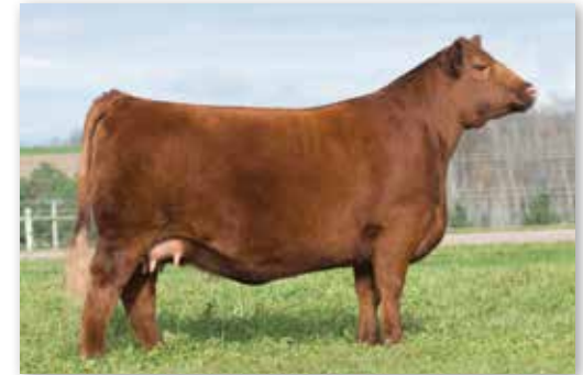
ORAR TOPEKA RB25 - Dam of Lot 18