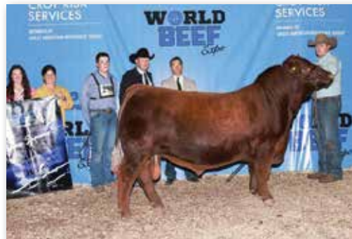
TC/HOC LONE STAR 22K - Maternal Brother in blood to Lot 12