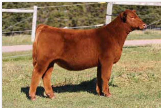
TC ELLIE 113K - $10,500 Full Sister to Lots 2 & 3