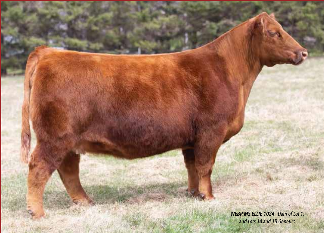
WEBR MS ELLIE 1024 - Dam of Lot 1, and Lots 1A and 1B Genetics