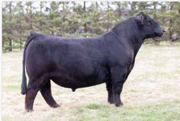
BRAND NEW MAN 001H - Sire of Lot 27