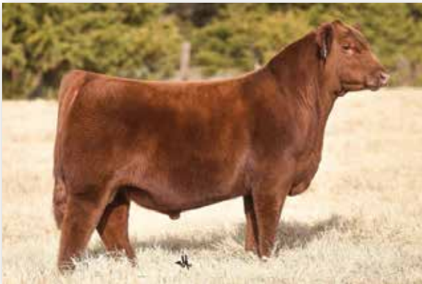
GCC JBCC HARVEST MOON 313K

Service sire to several females throughout the offering!