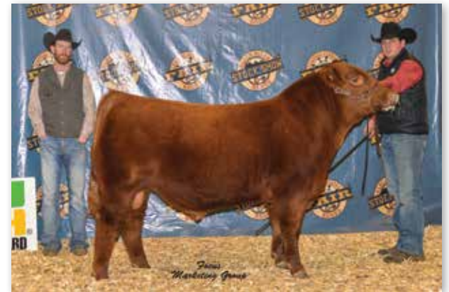
TC DR FEELGOOD 1506 - Sire of Lot 6