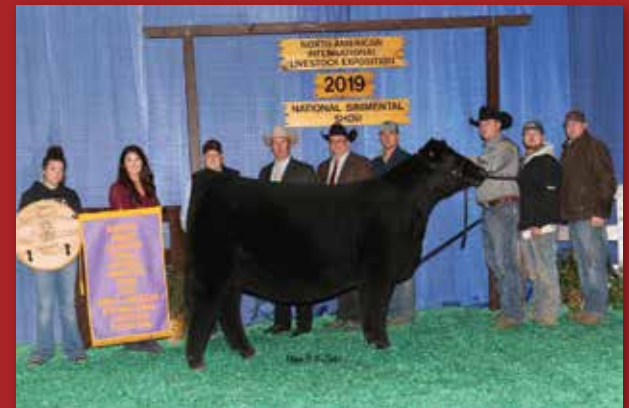
J6C WEIS MISS COCO 16F 2019 NAILE Reserve Grand Champion Purebred Simmental Heifer

Guaranteeing one 60-day pregnancy if transferred by a certified technician.