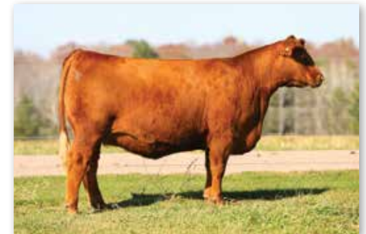
TC ADELLE 54J - Full Sister to Lot 12