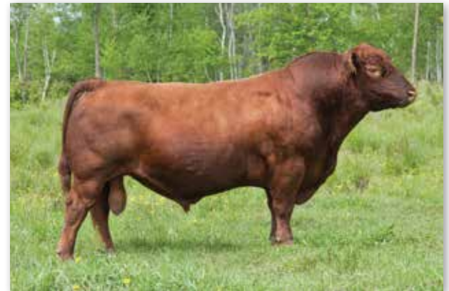
NBAR HAMLEY S913 - Maternal Grandsire of Lot 14

DUCH TC Miss Eagle 310L is a perfect representation of the breeding goals of our program, she blends the gap of production Red Angus seedstock and the ultra-attractive phenotype that would appease the most astute of cattlemen and women. We take pride in generating this type of female through our breeding program, built correct from the ground up, with the running gear that will outlast her breeding tenure, and the easy feeding type that regardless of environment will prosper and return profit. The EGL Red Eagle E7194 cattle continue to impress us the more that we are around them, his daughters are just beginning to enter production and its already obvious that his influence will remain strong in our cowherd for years to come.