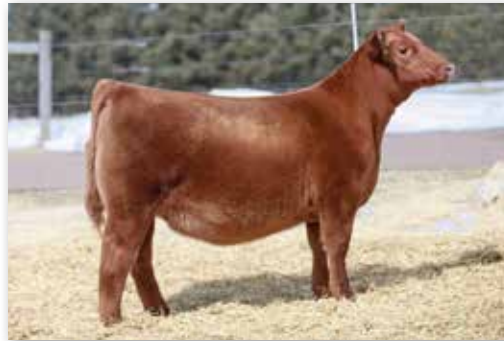
TC TOPEKA 138G - $18,500 Maternal Sister to Lot 18

The soul daughter of our tenured ORAR Topeka RB25 donor to sell in 2023. TC Topeka 68L has the added presence and intrigue that sets her apart, she is aware of her good looks as she struts around the pen, and sets down her big and square feet comfortably. Her long and sleek neck elevates high from her withers, and her later maturity pattern projects our vision of her as a big and powerful show heifer that will catch the eye of even the most demanding stockman. The Topeka tribe of females have got it done on the largest stages; we think this one will add to the legacy.