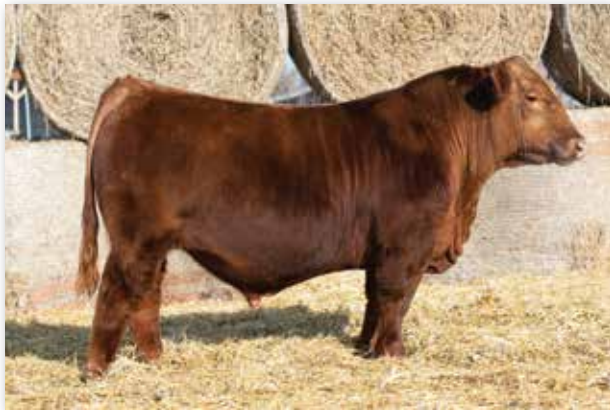
TC CB BIG FOOT 106J - Maternal Brother to Lot 19