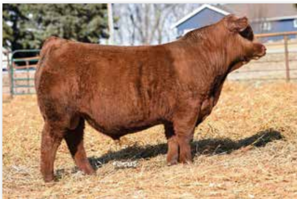
J2R RESOURCE 144J - Sire of Lot 16 & 17