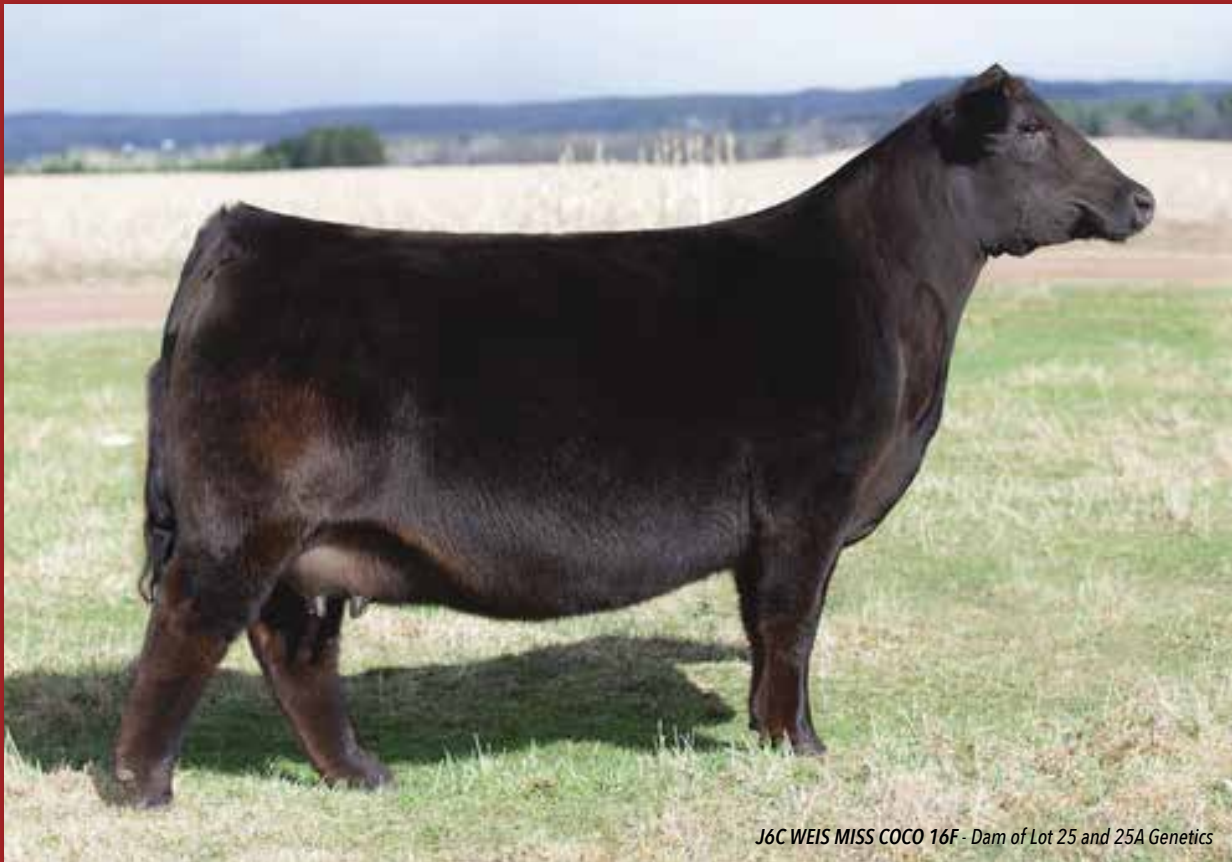
J6C WEIS MISS COCO 16F - Dam of Lot 25 and 25A Genetics