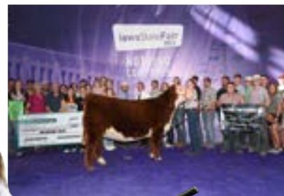
1. T/R JPDL GEORGIA KAY H50 ET "VERA" Dam of Lot 17