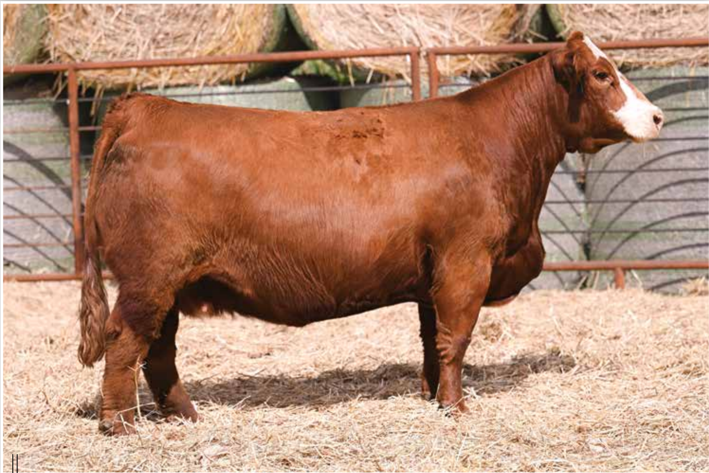
LOT 78 - CTN SS BWL KINLEY D004