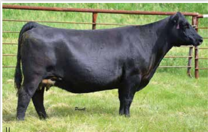
LAZY H BAR FOREVER LADY 361 - $50,000 MATERNAL SISTER TO DAM OF LOTS B3-B5

L133 is another direct daughter of the breed impacting JSUL Something About Mary 8421. She is supported by the Lazy H Bar Forever Lady 371 donor dam and is a maternal sister to lot B4 and B5. This fall yearling female will be ready to breed this winter to the sire of your choice. We have always admired the extra substance, volume, and capacity that she possesses. An exciting half-blood genetic package that aligns some of the highest dollar generating females in the industry!