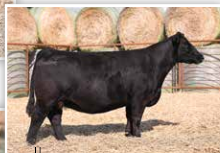
BFJV RUTH'S BANKROLL H300 DAM OF LOTS 48-50

Here is another standout daughter from the great BFJV Ruth's Bankroll H300 that is sired by OMF Hard Right H21. A neater featured, sleeker necked female that still offers tremendous rib shape and capacity. She is safe in calf with a heifer calf on the way sired by FRKG Classic 948K.