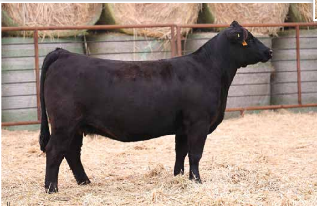
LOT 86 - BFJV MS SHANIAS PROFIT J0108

Here is another daughter of F064, the Profit son backed by the influential Miss Shania 6D. We love the extra eye appeal and length that this F064 daughters possess.