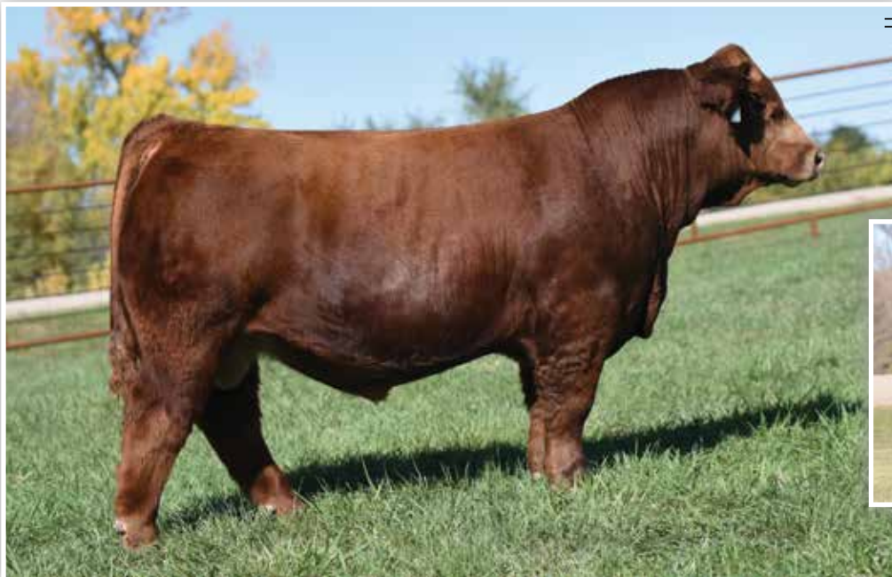
LOT A4 - BFJV SAM K338