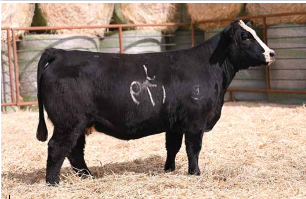
LOT 107 - BFJV MS PINNACLE J179

One of the Simmental breeds best kept secrets is the sire of lots 106 and 107. W/C Pinnacle E80 is the full brother to W/C Bankroll 811D that sires as much if not more volume and density, and consistently puts a perfect blaze face on his progeny. Lot 106 is a bold sprung, massive ribbed female that comes mated to the $530,000 SO Remedy 7F, it sounds like a recipe for success!