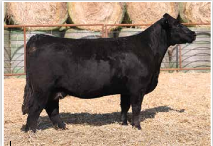
LOT 94 - BFJV MS BROKER E052

Here is a stunning daughter of the triple crown winning sire of champions, MR HOC Broker! E052 is so refined about her front third, smooth shouldered, and heavy structured. She is elegant in the way her neck ties in at the top side of her shoulder, clean chested, and offers tremendous length and stoutness. She sells safe in calf to In God We Trust, a mating that needs no introduction when it comes to generating elite show cattle!