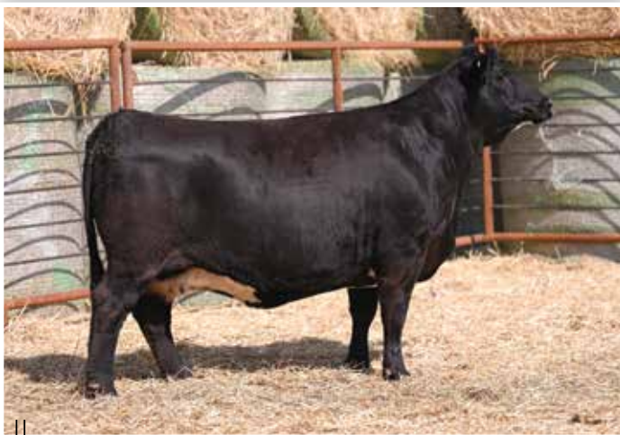
LOT 157 - BFJV MS 926

A big ribbed, easy keeping type female that is long necked, big hiped, and square built. She is also due in early February to highly regarded In God We Trust!