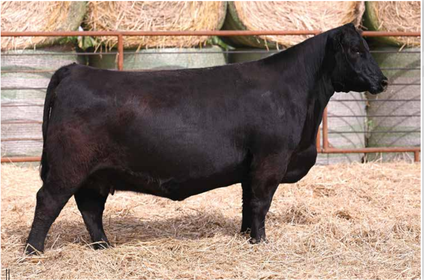
LOT 135 - BFJV CASINO LASSIE 455