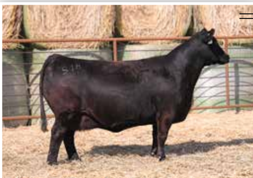
LOT 222 BFJV MS 708

AI Sire: TL LEDGER (ASA: 3240219) | AI Date: 7/11/23 | Due: 4/18/24