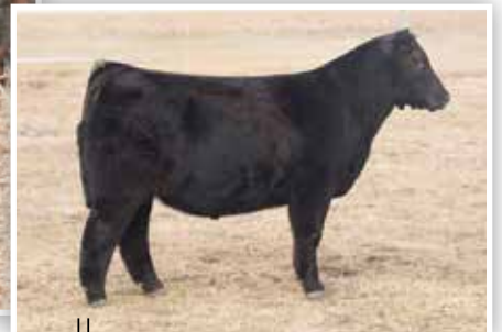
WEIS ALL ME 10F SIRE OF LOT 148

Weis All Me 10F continues to impress with each calf crop that is born. He has emerged as one of the "go-to" sires in the breed to produce elite Maine-Anjou and Maintainer influenced breeding stock. The skeletal quality, presence, and extra shape is what sets his progeny into a league of their own. Countless daughters have been high sellers and champions at the largest and most competitive shows in North America. She sells safe in calf to FRKG Classic 948K sexed female semen!