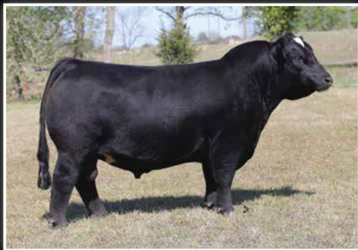
CONLEY HIGH RISE F3 - $100,000 SIRE OF LOS 56-61