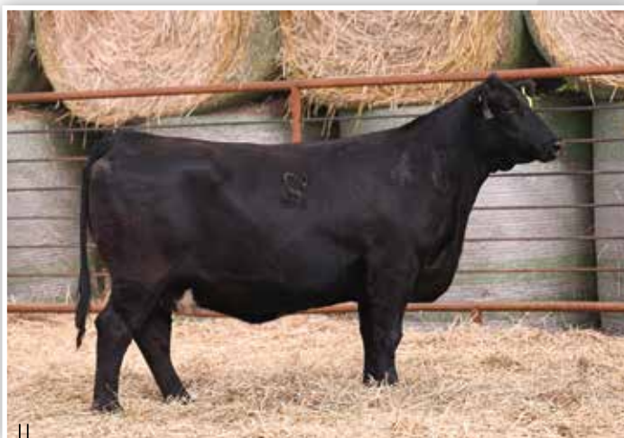
LOT 208 - BFJV MS 900