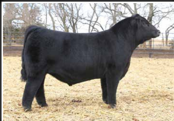
OMF HARD RIGHT H21 - $60,000 SIRE OF LOTS 48-55

AI Sire: W/C CYCLONE 385H (ASA: 3808072) | AI Date: 6/28/23 | Due: 4/5/24