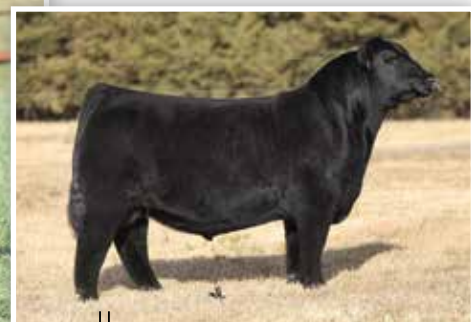
STAG GOOD TIMES 201 ET SIRE OF LOT A5

BFJV Good Time L346 is sired by the widely popular AI sire known as STAG Good Times 201 ET. He is supported by maternal prowess on the bottom side of his pedigree. L346 descends from the famed Lazy H Bar Forever Lady 5001 cow family, one of the truly elite maternal lines in the Angus breed. L346 has the look, the extra substance of foot and bone, and has been blessed with tremendous hair quality. His striking look and structural build will be conducive to siring elite Angus show cattle. Bid with confidence!