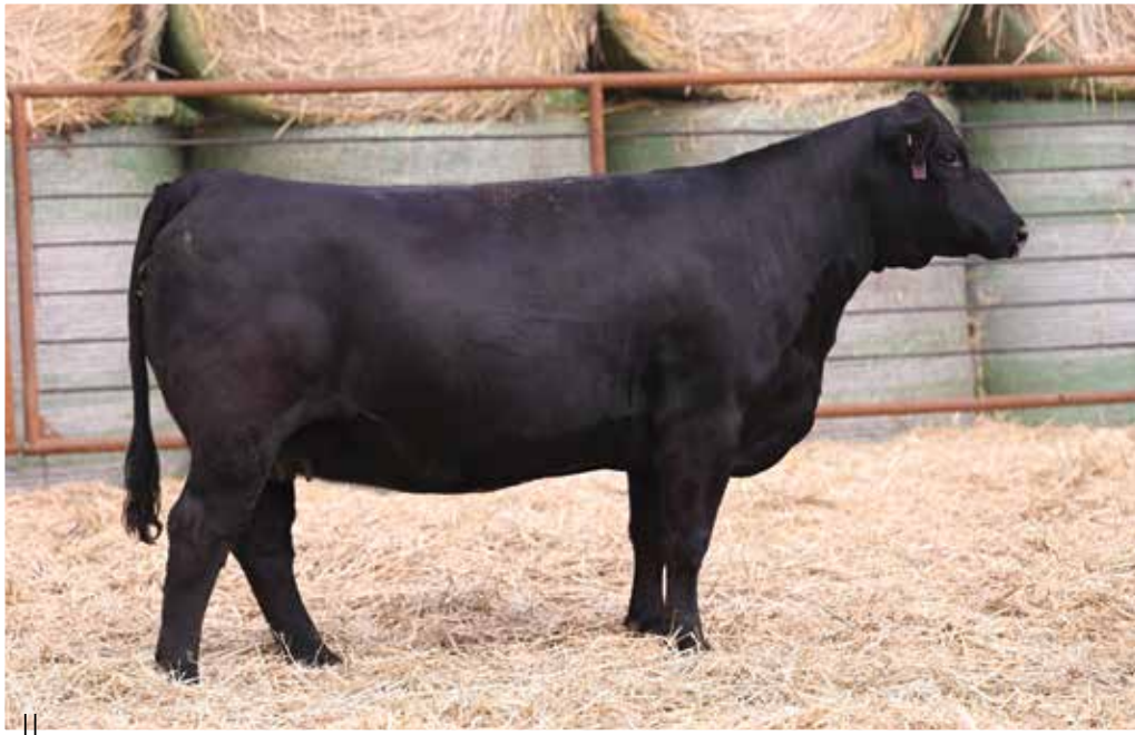
LOT 113 - BFJV MS NIGHT WATCH G90