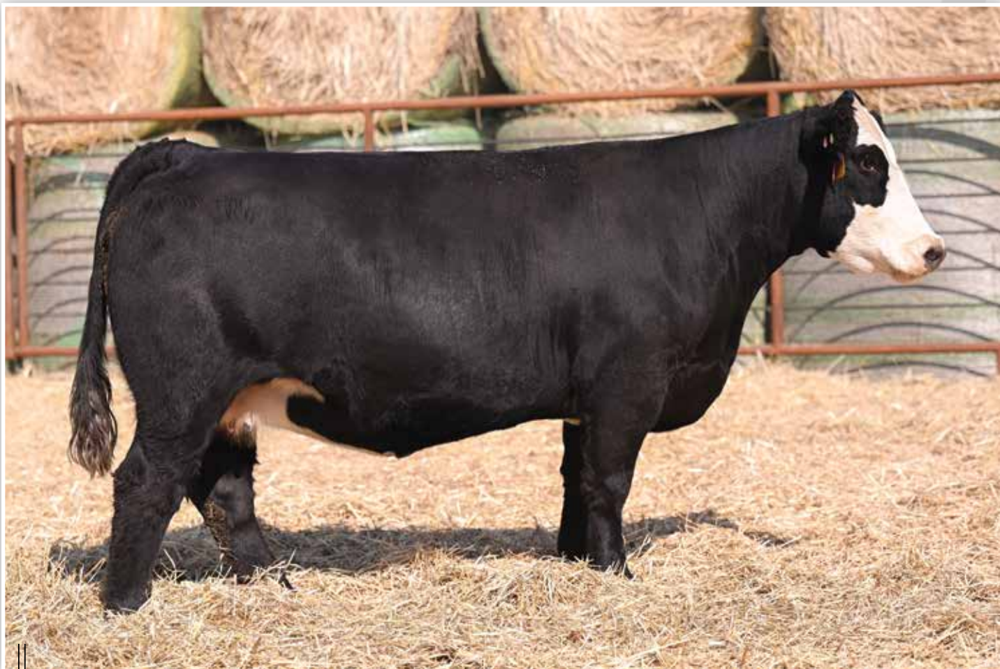
LOT 100 - BFJV MS BANKROLL H320