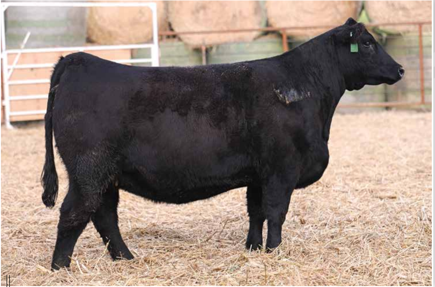
LOT 149 - ROZEBOOM 276