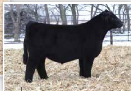
TL REVENANT 35 $100,000 SIRE OF LOT 70

K204 is sired by the $100,000 TL Revenant, one of the premier young sires in the breed that is owned by Jim Bowling and associates. There is no denying the sheer presence and uniqueness that he stamps his progeny with every single time! Here is a daughter that is certain to turn heads on sale day. A huge bodied, easy fleshing female that offers a superior structural build. She is safe in calf to the $210,000 FRKG Classic 948K... bid to own!