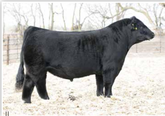
ACLL FORTUNE 393D - $185,000 MATERNAL GRANDSIRE OF LOT 3

AI Sire: CONLEY HIGH RISE F3 (ASA: 3700069) | AI Date: 5/3/23 | Due: 2/9/24