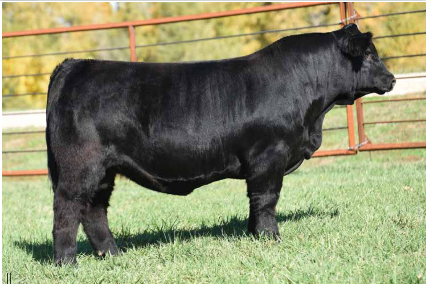
LOT A3 - BFJV SAM K339