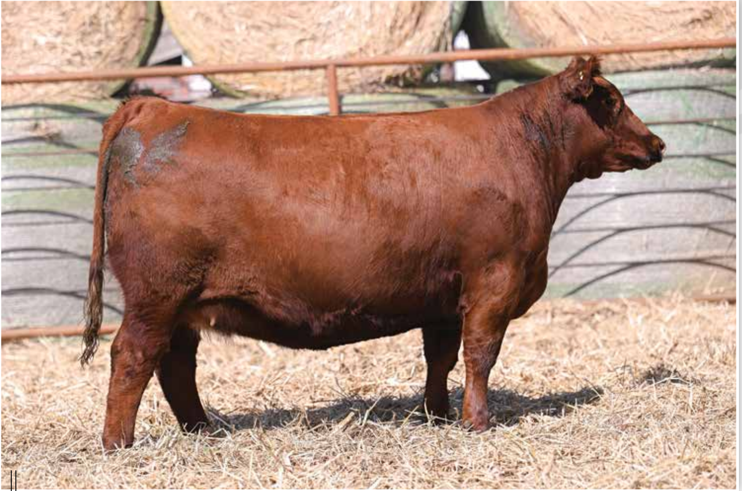
|| LOT 74 - BFJV MS HIGH RISE K277