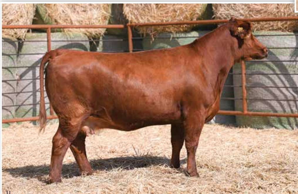
LOT 142 - LSF SRR LASS A3960 F8948

F8948 is half-blood Red Angus female sired by Leachman 18 Karat X235C that is backed by a daughter of the iconic WS Beef Maker R13. She offers an elite number profile that positions her among the top 5% CED, top 7% GM, top 8% WW, top 6% YW, top 4% HPG, top 1% YG, top 1% REA, and top 23% Marb. A unique red hided breeding piece with unlimited upside numerically.