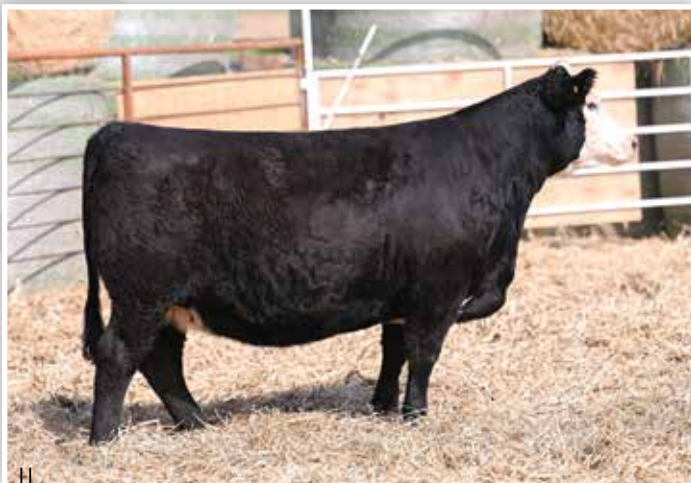
LOT 62 - BFJV MS THOR K288