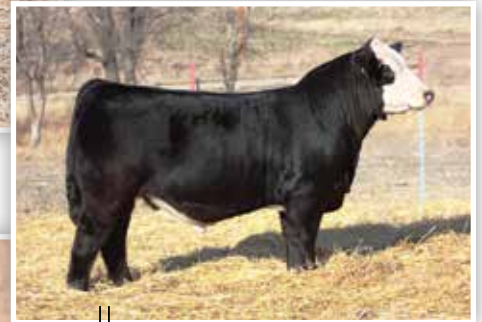
W/C LOADED UP 1119Y SIRE OF LOTS 28 & 29

Bold, massive, and loaded with dimension... a few of the ways that we feel best describe the unbelievable body style that K260 possesses. This full face baldy is an absolute beast of a brood cow prospect that has the credentials to be a truly dominant producing female in production. We love the structural build, udder development, and natural volume that she brings to the table. This daughter of the iconic W/C Loaded Up 1119Y is a must see on sale day!