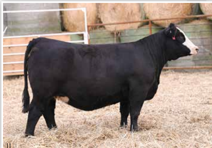
LOT 4 - BUE MS VENTIA

BUE Ms Ventia is supported by the genetic combination that has propelled the Simmental breed into the future! There is no question that SO Remedy 7F clicks when mated to Profit daughters, and this stunning blaze faced female is a prime example! Massive bodied, square built, and loaded with power from end to end. She sells safe to the $250,000 TL Ledger with a Purebred calf on board for a huge return!