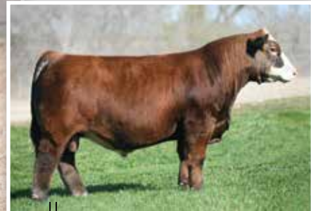
W/C CYCLONE 385H SERVICE SIRE TO LOTS 143 & 144

This huge bodied, easy fleshing, sound structured Red Angus female offers a look of maternal functionality without sacrificing quality. She sells safe to the red baldy stud, W/C Cyclone 385H!