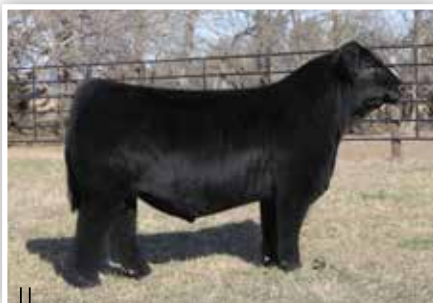
FRKG VICTORY 78J $210,000 SIRE OF LOT A1

We initiate a hand selected group of bull calves that undoubtedly have herd sire credentials with a direct son of the $210,000 and now deceased FRKG Victory 78J. There is no question that L334 has the body, dimension, and overall masculinity needed to be a herd sire of significance for any program that makes the investment. This stud is a true beef bull, exemplifying the fundamentals without sacrificing the extra eye appeal and skeletal quality that is demanded by today's industry. The dam of L344 is the impressive BS Curiosity 10G donor dam, a direct daughter of the great JASS On The Mark 69D. A full sister sold at Meyer Genetics for $13,500 and a maternal sister sold for $21,000. Here is your opportunity to get in on the ground floor of one of the very best herd sire prospects to ever surface in Mapleton, Iowa!