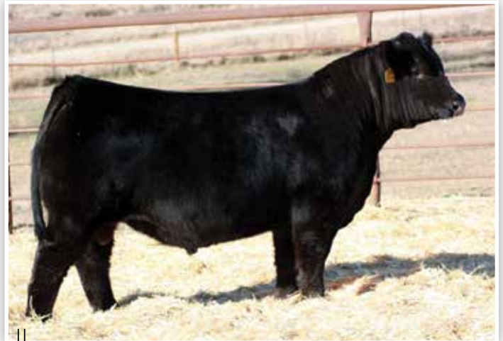
W/C NIGHT WATCH 84E - SIRE OF LOT 113

BFJV Ms Night Watch G90 would have to be one of the stoutest and most powerful daughters of the $142,500 W/C Night Watch 84E in existence. She is extra wide pinned and massive hiped, with plenty of hindquarter and lower stifle. She stems from the maternal power of a standout SS/PRS High Voltage 244X daughter and has already raised a daughter that's been retained. Power cow deluxe!