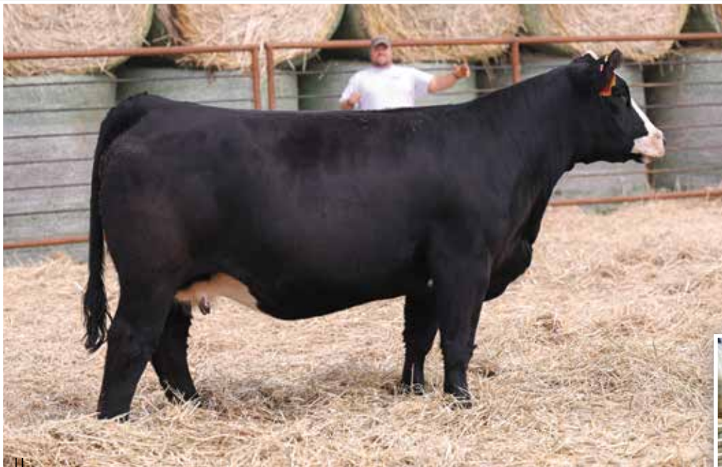
LOT 106 - BFJV MS PINNACLE J181