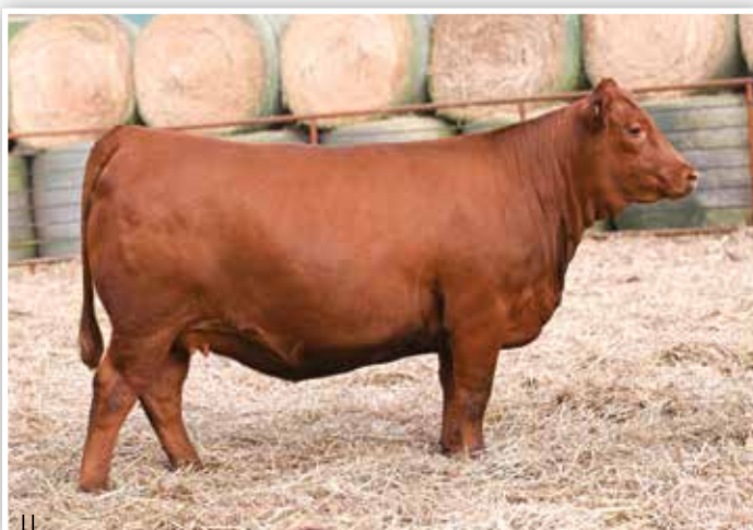
LOT 77 - BFJV MS HIGH RISE K291

Powerhouse SimGenetic female that is sired by Conley High Rise F3. This red hided blaze faced female is massive from every angle. She has the makings of a tremendous brood cow prospect that should add longevity to your cowherd.