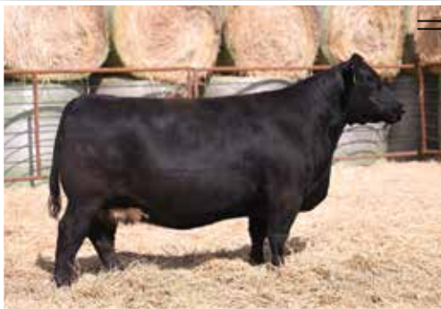
LOT 221 BFJV MS 529

AI Sire: TL LEDGER (ASA: 3240219) | AI Date: 7/7/23 | Due: 4/14/24