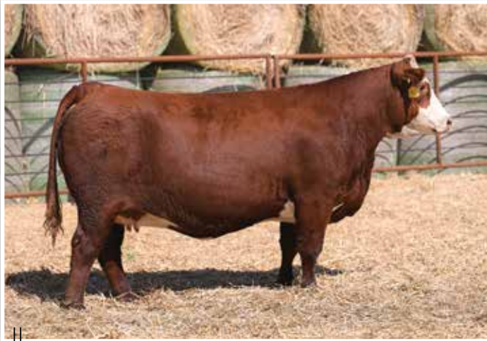
LOT 169 - BFJV MS 983