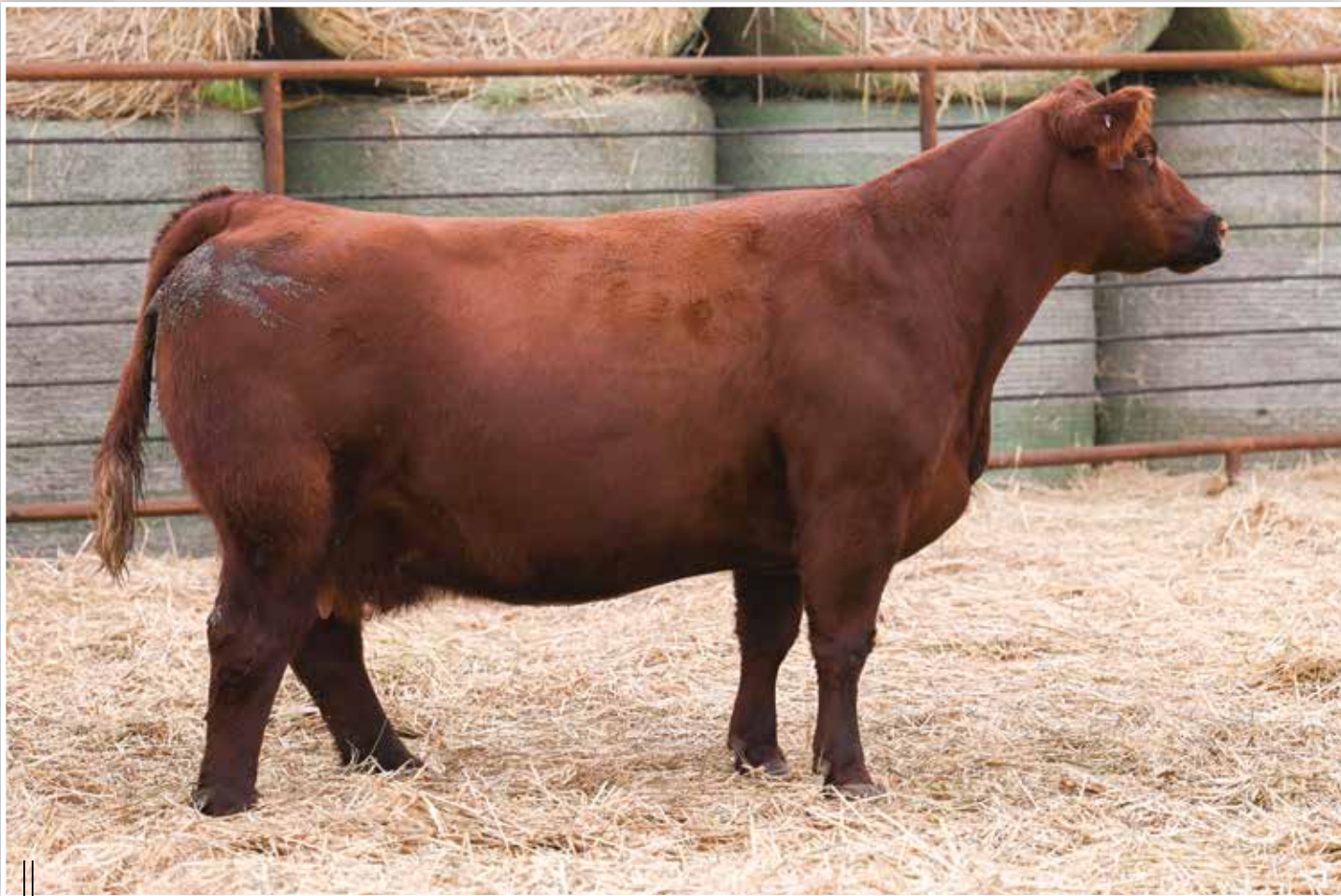
LOT 145 - BFJV SAFE & SOUND D70