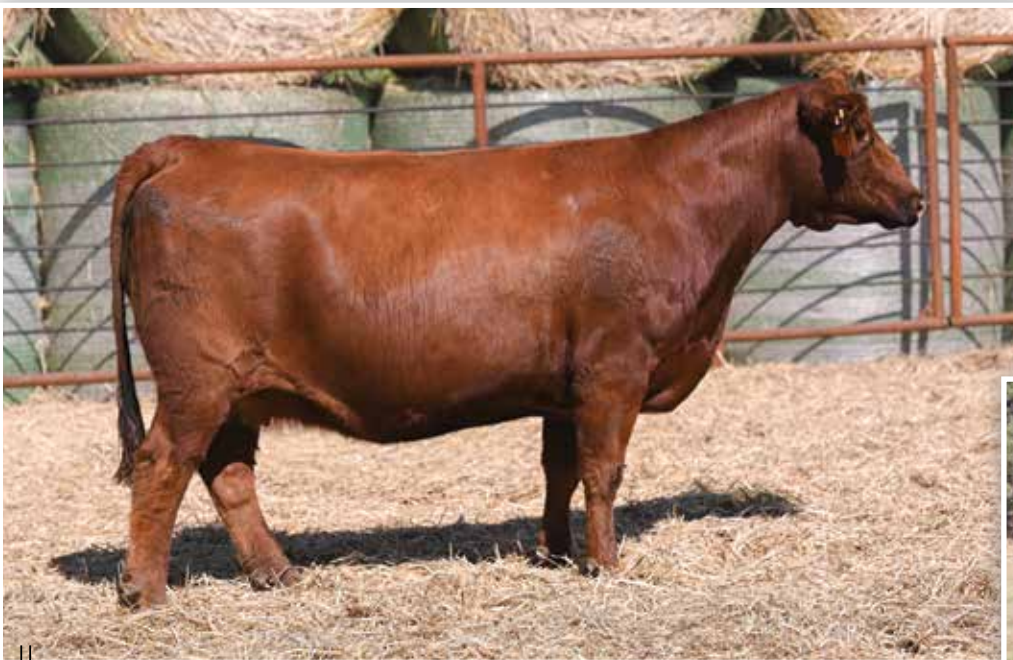
LOT 83 - BFJV KRB MS VOLTAGE E002