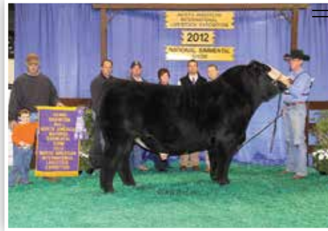
MR HOC BROKER TRIPLE CROWN WINNING SIRE OF LOTS 94 & 95