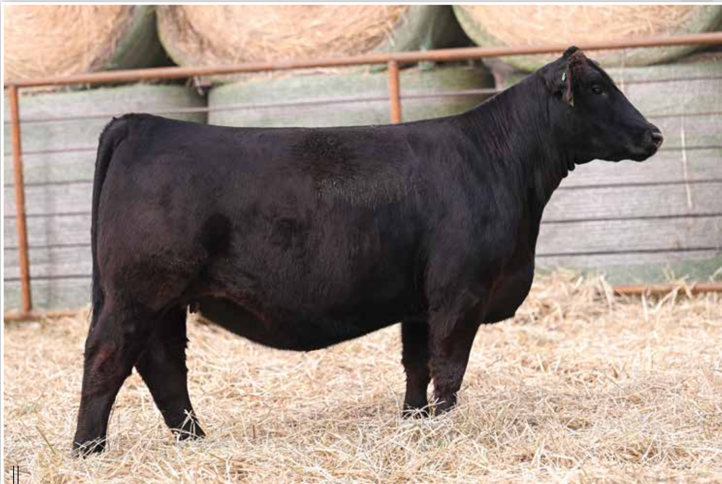
LOT 34 - BBB CYCLONES BIANCA K042