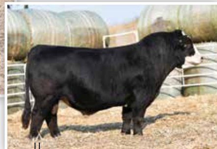
W/C PINNACLE E80 SIRE OF LOTS 106 & 107