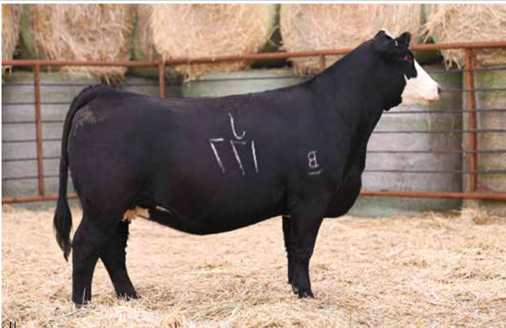
LOT 105 - BFJV MS LOADED UP J177

KBC Miss Loaded 9275G is a higher percentage Simmental female that that leads off the W/C Loaded Up 1119Y sire group. 1119Y featured in the 2017 Embryos on Snow when he sold for $240,000 for half interest. He since has become known as a one the breeds premier female generating options.