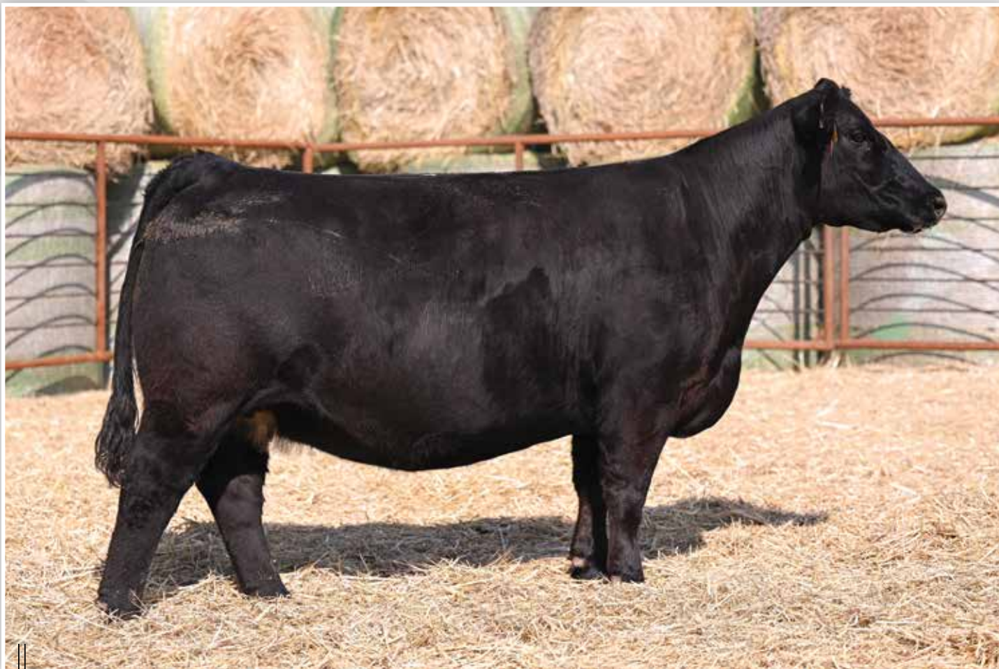
LOT 99 - BFJV RUTHS BANKROLL H300