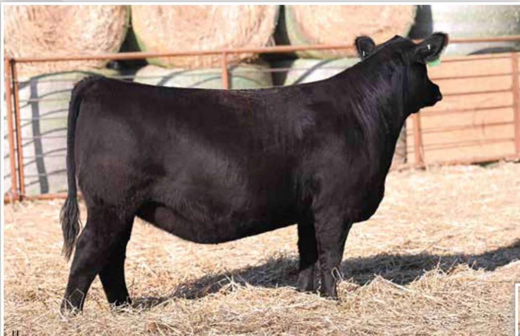
LOT 49 - BFJV RUTH'S HARD RIGHT K247

Here is another standout daughter from the great BFJV Ruth's Bankroll H300 that is sired by OMF Hard Right H21. A neater featured, sleeker necked female that still offers tremendous rib shape and capacity. She is safe in calf with a heifer calf on the way sired by FRKG Classic 948K.