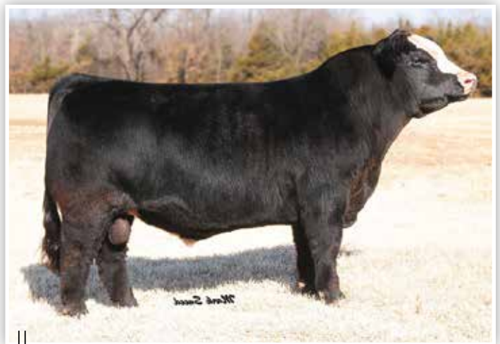
GCC WHIZARD 125W - SIRE OF LOT 72

It's no secret that GCC Whizard 125W sired females are among some of the most valuable property to own in the business! Countless daughters across the country are responsible for high sellers, show ring champions, and individuals of influence. Her dam is sired by JASS on the Mark 69D, another standout sire option with unmatched eye appeal and style! She sells safe to FRKG Classic 948K with a confirmed heifer calf pregnancy!