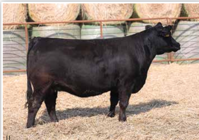
|| LOT 120 - BFJV MS SAVAGE J0134

She is a beast in the flesh, not only is her body shape on the massive side, her bone and foot size match it. A young cow that is just hitting her pinnacle breeding years, we have made sure your return investment will be quick with her mating to our exciting new FRKG Classic 948K. I cannot stress how impressive this one is when you inspect her.