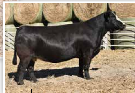
MISS SHANIA 6D DAM OF LOT 21