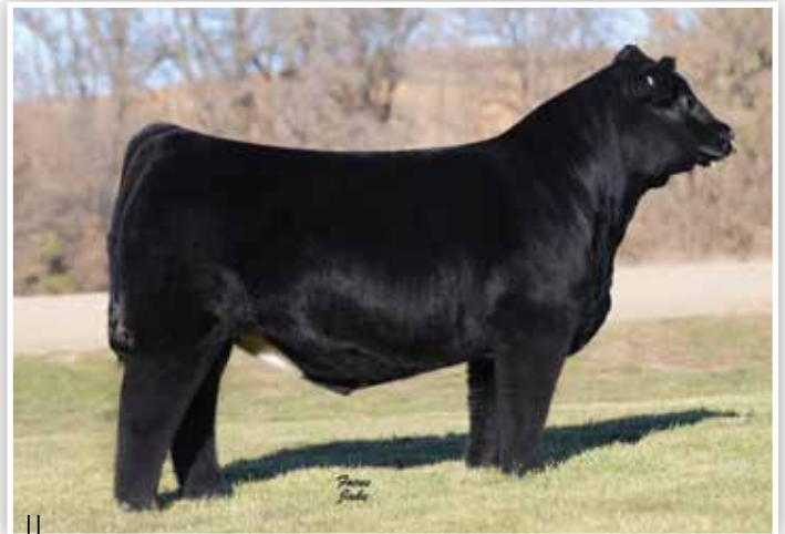
|| BFJV MARGIN D9040 - SIRE OF LOT 146

Here is an ultra-complete daughter of BFJV Margin D9040 that is backed by a Prototype dam on the maternal side of her pedigree. BFJV Margin D9040 is the Irish Whiskey sired son of Moore Fantasia 16B, the MR HOC Broker daughter that is supported by the famed JS Burning Hope 205 matriarch. She sells safe in calf to In God We Trust, which we anticipate being an absolute homerun mating when you consider her pedigree stacks individuals of major influence within the show cattle industry... this female is carrying what could be a big league ROI.