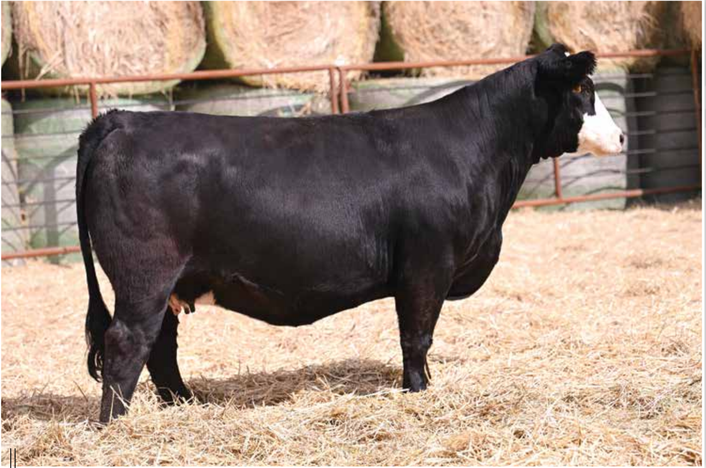
LOT 108 - BFJV MS BULLSEYE J0123