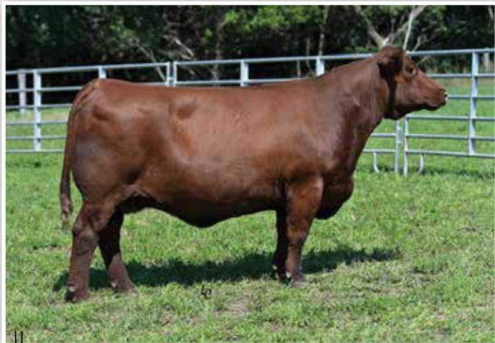
EKHCC RED JEWEL 760 - ICONIC DAM OF LOT 78

D004 is a special sale feature that is undeniable in terms of both her pedigree and phenotype! This striking red hided blaze faced female is an absolute smoke show in terms of her extra substance of foot and bone. She is wide bodied, square hiped, and loaded with power from end to end. Maternally you will find the iconic EKHCC Red Jewel 760, a female that has stood the test of time, generating the right kind for more than a decade now and regardless of the mating she proves to continually add breeding accomplishments to her resume. She may have passed but there is no question that her legacy will be long felt in the Simmental breed with her exceptional set of daughters working in the top firms across the country. A sale feature that sells safe in calf to the $620,000 record selling STCC Tecumseh 058J!