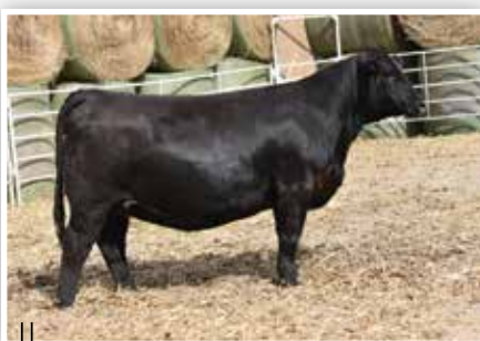
BFJV SHANIA'S LEDGER H064 FULL SISTER TO LOTS 87-90