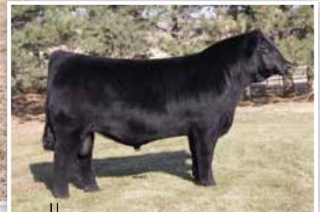
SS/PRS HIGH VOLTAGE 244X SIRE OF LOT 83