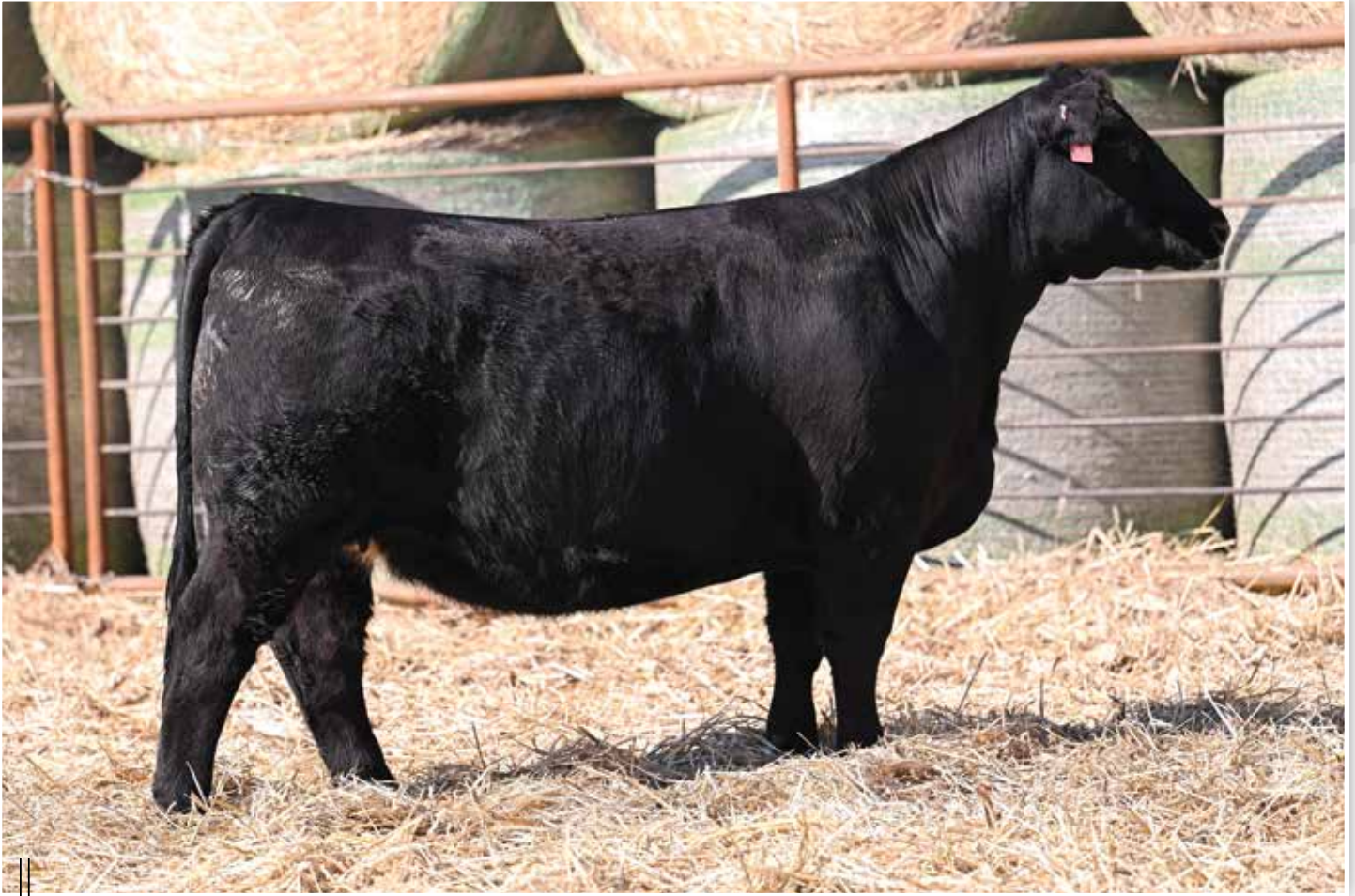
LOT 2 - BFJV RUTH'S REMEDY K237