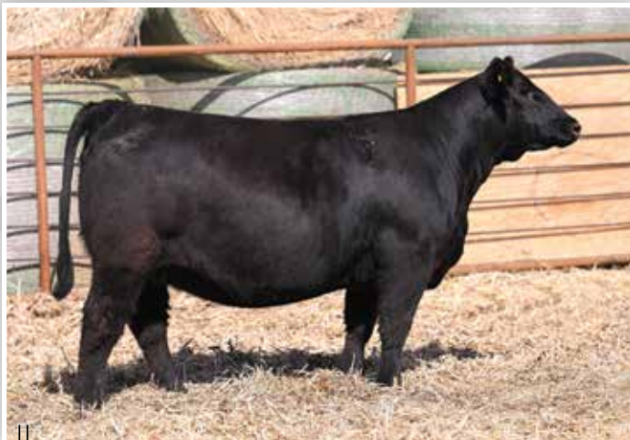
LOT 136 - ROZEBOOM 236