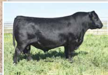
EXAR STOCK FUND 9097B SIRE OF LOT 139

A&B Lucy 2108 is by EXAR Stock Fund 9097B and backed by the influence of KMK Alliance 6595 I87, the Sitz Alliance 6595 son. She is an easy keeping, ultra-broody female that is sound built and offers an abundance of volume. She ranks top 20% WW, top 20% YW, top 15% YH, and top 30% CW. She sells safe in calf to the $210,000 FRKG Classic 948K for a BIG return on investment!