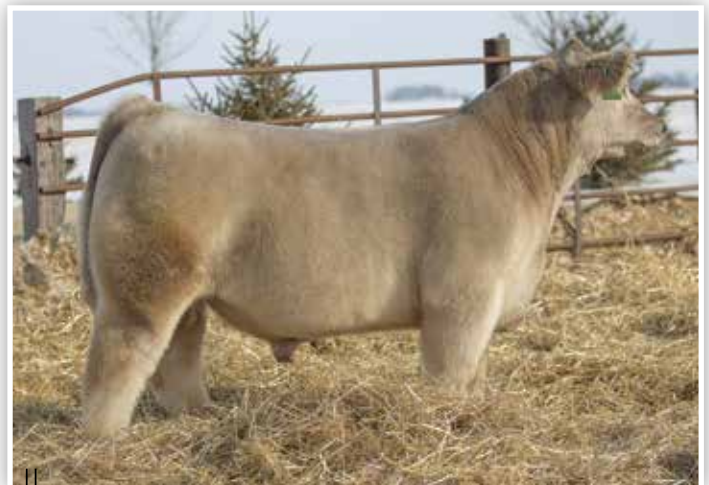
HOLY SMOKER - SIRE OF LOT 158