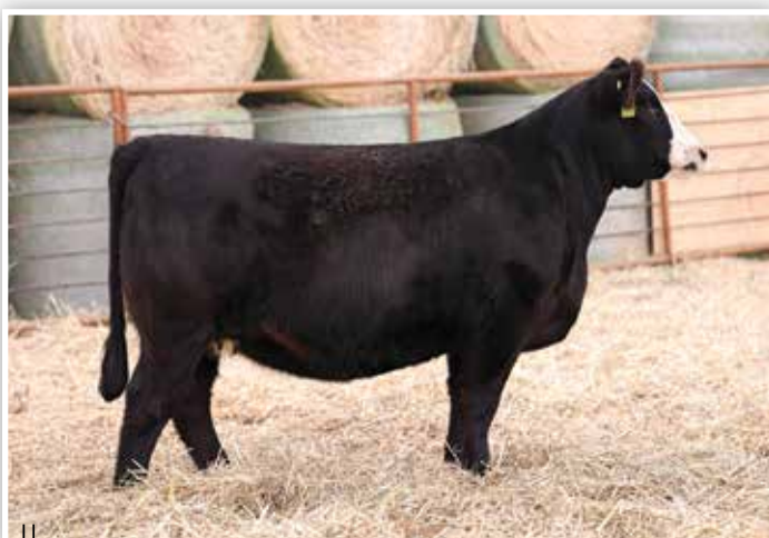
LOT 14 - BFJV MS REMEDY K242

K218 is a stout made female by SO Remedy 7F that is long sided, bold centered, and sets to the surface with a superior foot shape. She is a low input type female that will be praised in production for her efficiency. Confirmed safe to Conley High Rise F3 sexed female semen!