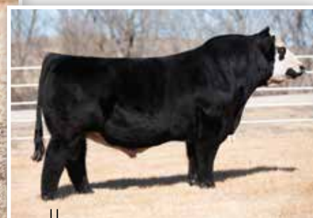
SFI SAVAGE D20 SIRE OF LOT 71

This half-blood daughter of SFI Savage D20 is a productive designed female with an abundance of rib shape and capacity. She too sells safe in calf to FRKG Classic 948K with a heifer calf on the way!