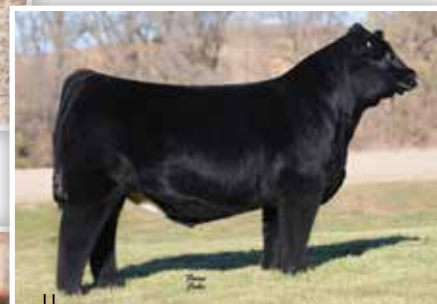
BFJV MARGIN D9040 SIRE OF LOTS 133 & 134

This daughter of BJFV Margin D9040 could easily be one of the most phenotypically elite animals in our entire bred female offering, this one's build is so intriguing. The way she combines an eloquent and square topside of her skeleton with a robust and overwhelming bottom half puts her in another category in our opinion. Add the splashes of chrome and mating to In God We Trust and we think the opportunity for quick ROI here is big time!