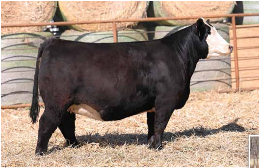
LOT 28 - BFJV MS LOADED UP K260

Bold, massive, and loaded with dimension... a few of the ways that we feel best describe the unbelievable body style that K260 possesses. This full face baldy is an absolute beast of a brood cow prospect that has the credentials to be a truly dominant producing female in production. We love the structural build, udder development, and natural volume that she brings to the table. This daughter of the iconic W/C Loaded Up 1119Y is a must see on sale day!