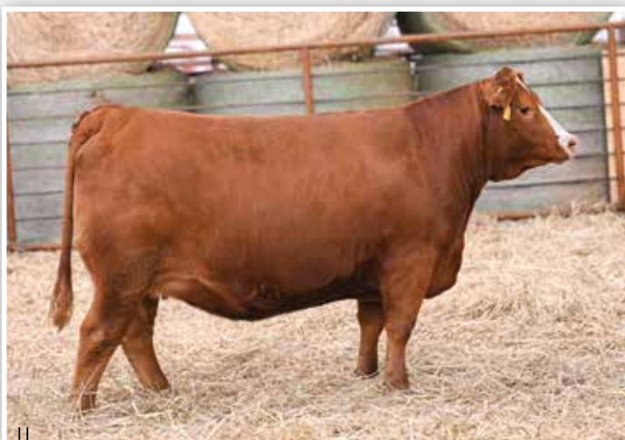
LOT 76 - BFJV MS HIGH RISE K284

K283 is a sleek made, angular red blaze faced heifer by Conley High Rise F3. She is long fronted, smooth made, and offers a brood cow look with tremendous quality and eye appeal.