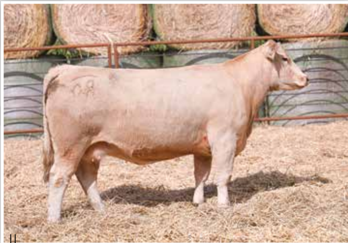
LOT 161 - BFJV MS 2023