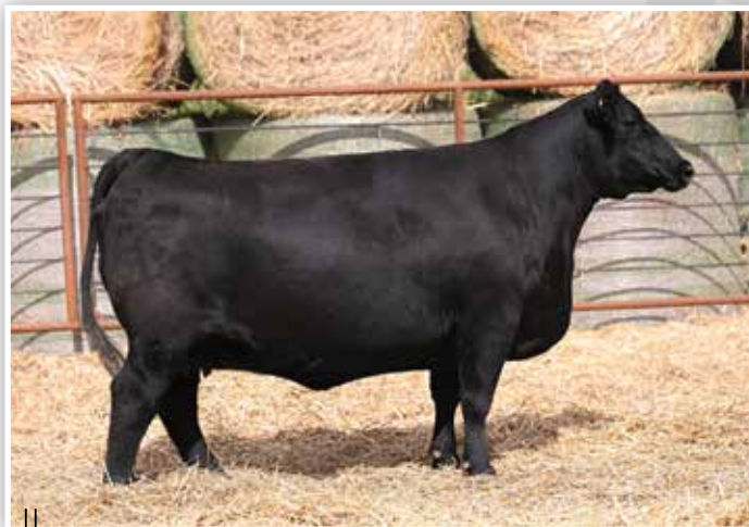
LOT 217 - BFJV MS 002

AI Sire: TL LEDGER (ASA: 3240219) | AI Date: 6/25/23 | Due: 4/2/24