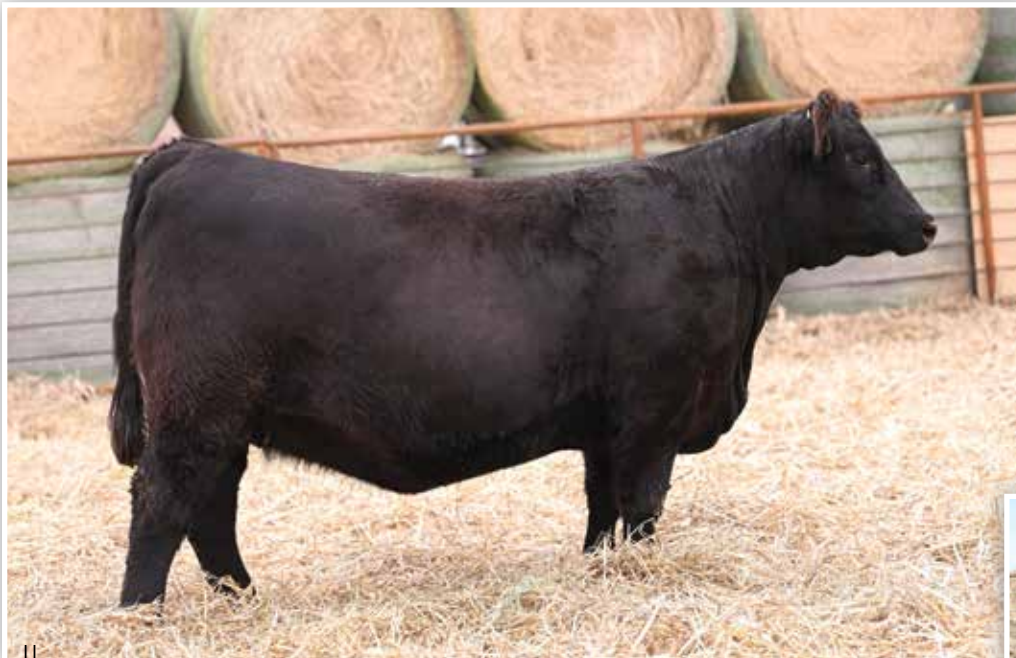
LOT 51 - BFJV MS HARD RIGHT K236

STOUT... be sure to check out this OMF Hard Right H21 daughter if you like your cattle with a little extra punch! A massive ribbed, easy fleshing body style that is complimented by the extra foot and substance of bone. She is confirmed safe in calf to the $210,000 FRKG Classic 948K with a heifer calf!