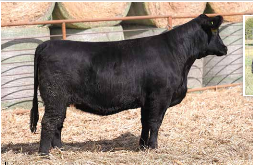
LOT 22 - BFJV MS REMEDY K201