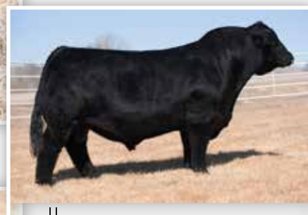
STN MISS STAR LIGHT MATERNAL SISTER TO TL LEDGER

Here is a neat featured, smooth shouldered daughter of TL Ledger that is sound footed, big ribbed, and offers a low maintenance look of quality and productivity. Safe to Conley High Rise F3 sexed female semen for a fast ROI.