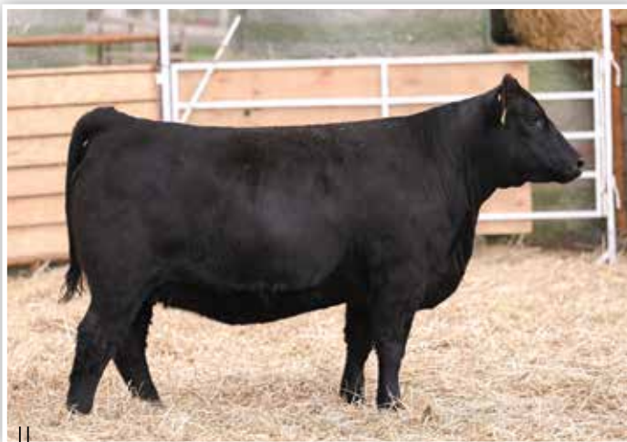
LOT 12 - BFJV MS REMEDY K211

K211 is another low input daughter of the $530,000 record selling SO Remedy 7F. She is sensible in her frame size, bold bodied, and sound footed. She is safe in calf to sexed female Conley High Rise F3 semen!