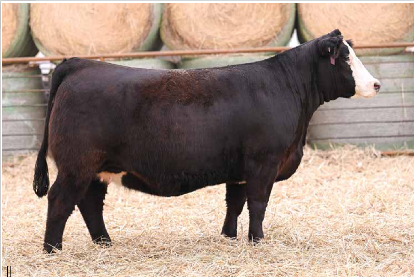
LOT 30 - BROKER SAVAGE J622