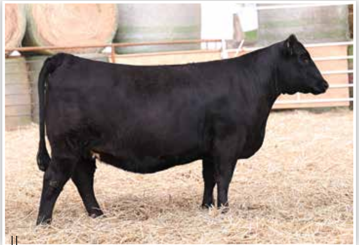
LOT 17 - BFJV MS REMEDY K282

Another elegant designed daughter of SO Remedy 7F that is so refined about her front third yet offers an abundance of body mass and capacity through her midrib. She is developing a picture perfect udder design to compliment her efficient brood cow look.