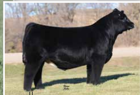
BFJV MARGIN - MATERNAL GRANDSIRE OF LOT A4