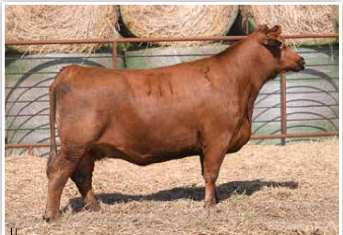
|| LOT 166 - BFJV MS 916

Bigger framed, and cowy Red Angus female that has functionality and profitability written all over her. She is the kind for a cowboy that is focused on increasing efficiency and maternal power of the cowherd. She comes bred with heifer sexed semen to the female generating BFJV Margin D9040, as these Margin sired cattle continue to develop they impress us more and more.