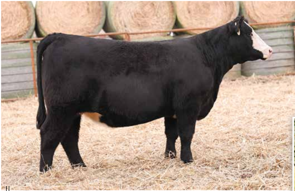
LOT 150 - BFJV MS GOOD AS IT GETS 12