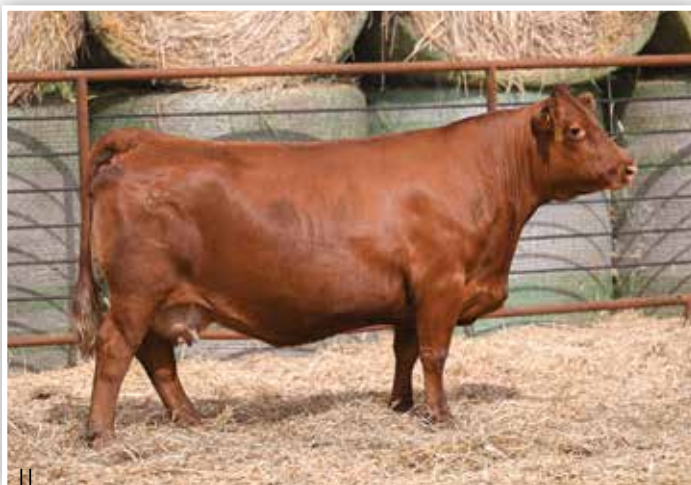
LOT 162 - BFJV MS 616

Did you notice that both the Champion and Reserve Champion Steers at the American Royal were both smoky and golden colored In God We Trust sons, and that the list of high sellers again from this 2023 Sale Season is littered with IGWT progeny? The train is picking up steam, make sure you're on board.