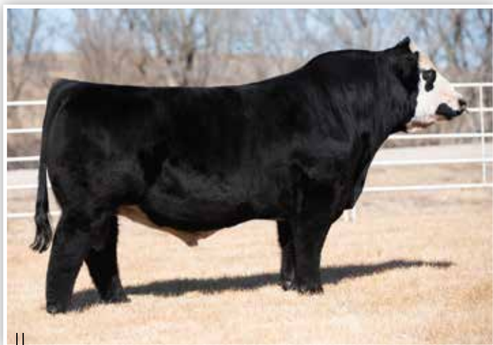
SFI SAVAGE D20 - MATERNAL GRANDSIRE OF LOT 30

A double half-blood mating that resulted in one of the premier bred heifers in this year's offering! J622 is sired by a son of the triple crown winning MR HOC Broker that is backed by the iconic Leachman Right Time. The dam of this female is sired by SFI Savage D20, our selection from Schaae Farms a few years ago that traces to a full brother to the legendary MR HOC Broker. This female offers a pedigree that aligns the iconic JM BF H25 twice! This stunning blady female sells safe in calf to the $210,000 FRKG Classic 948K!