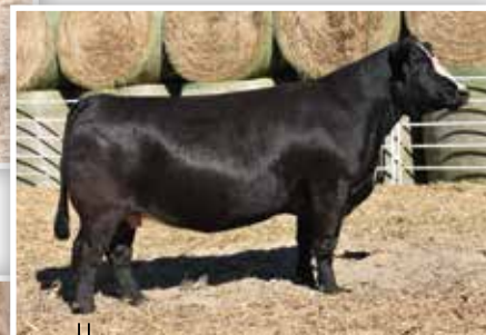
MISS SHANIA 6D - PATERNAL GRANDDAM OF LOTS 85 & 86

A paternal granddaughter of Profit that offers the influence of Ms Shania 6D, one of the most lucrative females to ever call home to Bruhn Cattle Company. J2058 is a stout featured, ultra-attractive female that is extended about her front third.