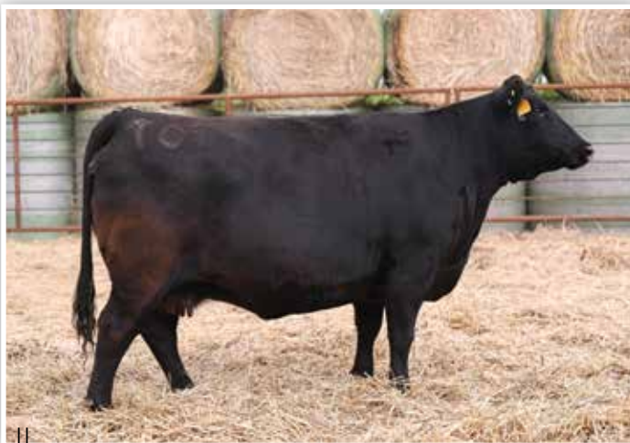
LOT 214 - BFJV MS 41