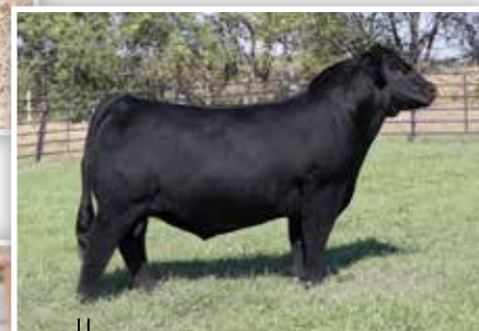
FRKG CLASSIC 948K Service sire to several females throughout the offering!

Conley High Rise F3 has secured his place as one of the premier sires in the breed. He is supported by a tremendous dam, Conley Sheza Star D3, the $120,000 high selling Simmental female in the Conley Cattle Fall Production Sale that was selected by Lindskov's LT Ranch and Aces Wild Ranch. This three-quarter blood blaze faced female offers a stunning look of quality and style from the side. A must see set of females sired by a maternal legend within the Simmental breed.