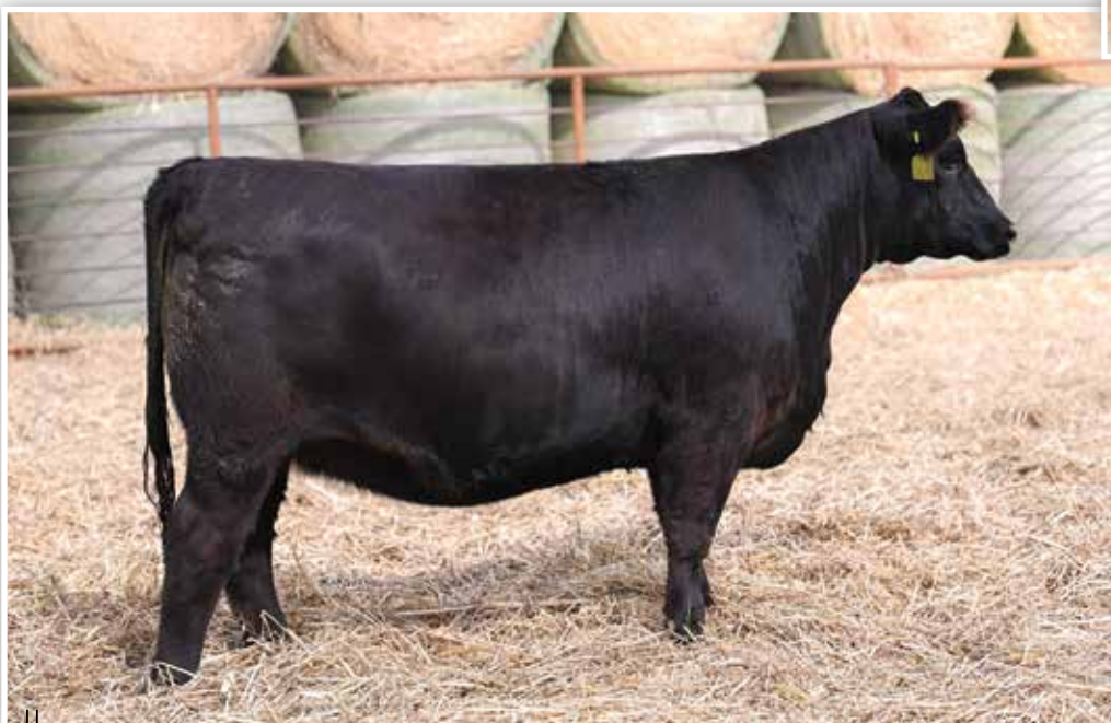
LOT 67 - BFJV MS LEDGER K223

We love the efficiency and productive body style that the TL Ledger daughters possess. Here is a prime example of why we continue to utilize TL Ledger heavier each year. She is safe in calf to the resident herd sire at Bruhn Cattle Company, W/C Cyclone 385H.