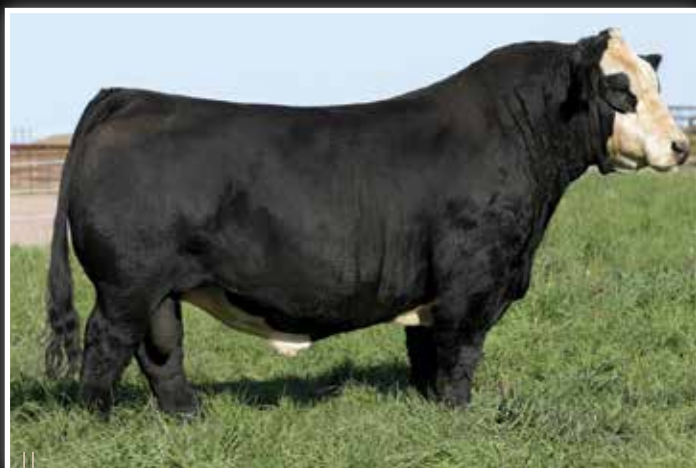
W/C BANKROLL 811D - $205,000 SIRE OF LOTS 23-27

We lead off the W/C Bankroll 811D sire group with a real showstopper! There is no question that BFJV Ms Bankroll K200 is one of the most eye appealing females in the entire offering. She is so sleek and refined about her front third, smooth shouldered, and transitions into a bold and three-dimensional rib design. She further compliments her extra volume and capacity with a perfectly etched blaze face! This brood cow in the making sells safe to the $250,000 TL Ledger due in early March for a BIG return!