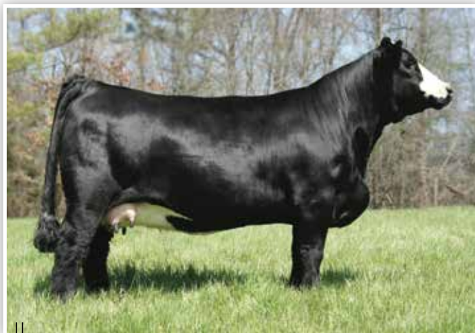
MISS CCF SHEZA BABE U2 - DAM OF LOT 33