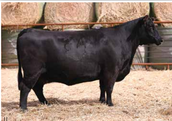
LOT 183 - BFJV MS 883