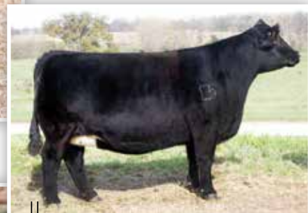
MISS STAR ABOVE PATERNAL GRANDDAM OF LOTS 65-69

A sleek made, ultra-refined, high quality daughter of TL Ledger. She is so smooth shouldered, clean chested, and offers a look of quality from the side that is sure to catch your attention. This female has been mated to W/C Cyclone 385H, the captivating red baldy herd sire at Bruhn Cattle Company!