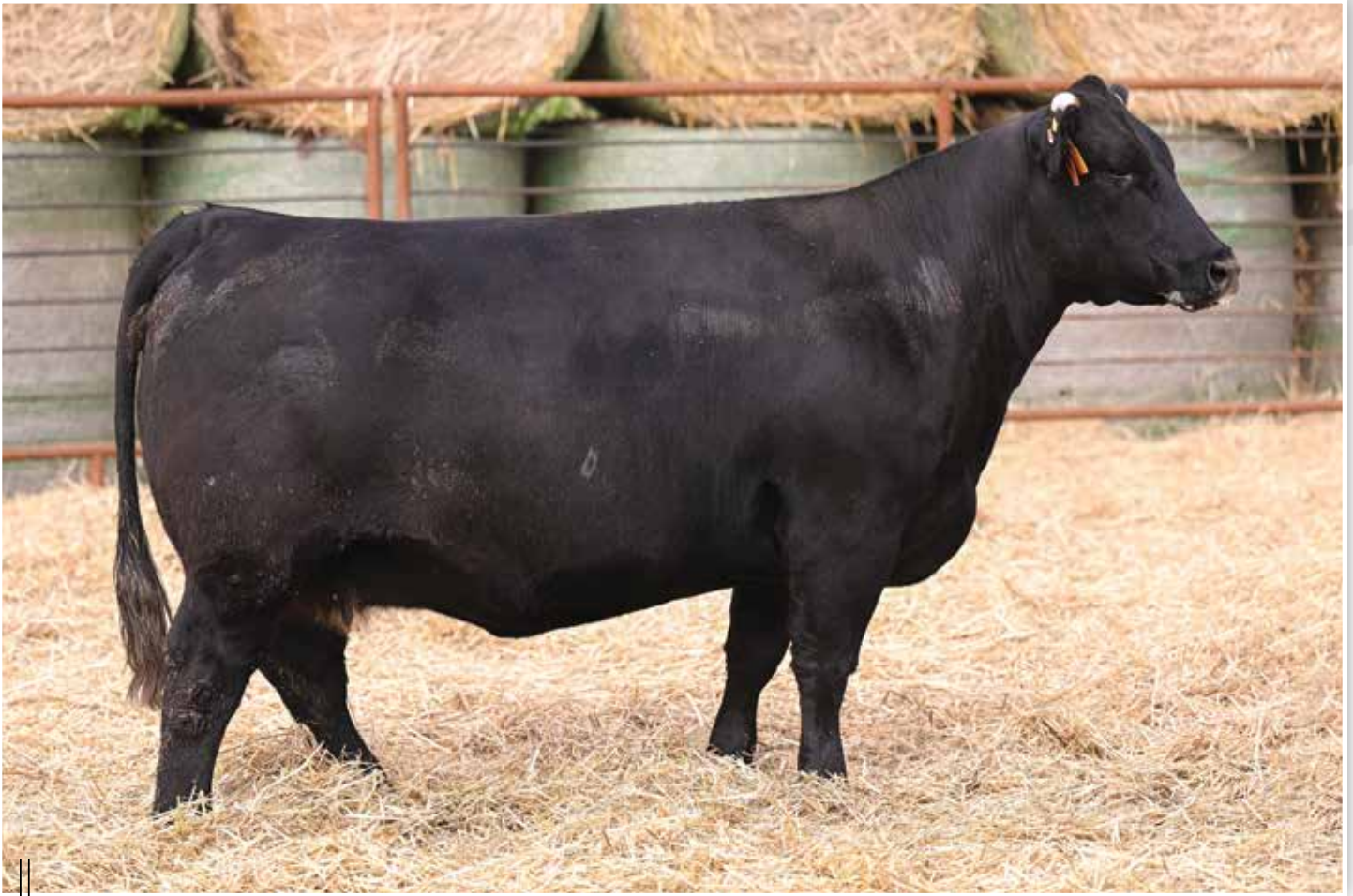
|| LOT 146 - TLLC 912G