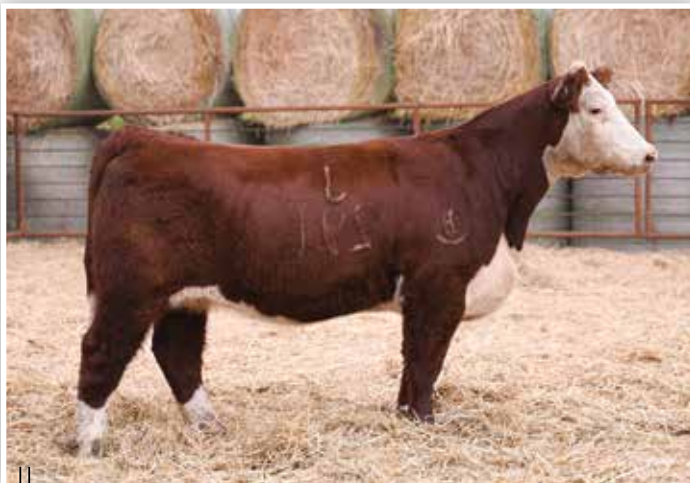
LOT 170 - BFJV MS J291

Once you see this one you won't forget her, check out the big set of fuzzy ears and perfect markings that this one was blessed with. There is no shortage of dimension and mass all the way through her build, get behind her and check out the back and hip shape. She is an absolute powerhouse that we think could flat raise one, her mating with W/C Cyclone 385H is just the beginning.