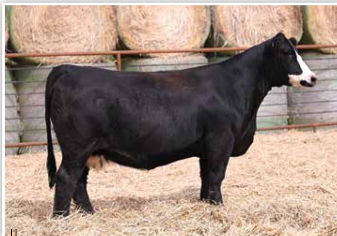
LOT 117 - BFJV MS SAVAGE H397

An extra eye appealing, up headed and fancy featured daughter of SFI Savage D20, we admire the design and elegance that this half-blood female carries herself with. This blaze faced female is carrying a W/C Night Watch 84E sired calf due the beginning of March, this mating aligns perfectly to provide extra depth and cowiness.