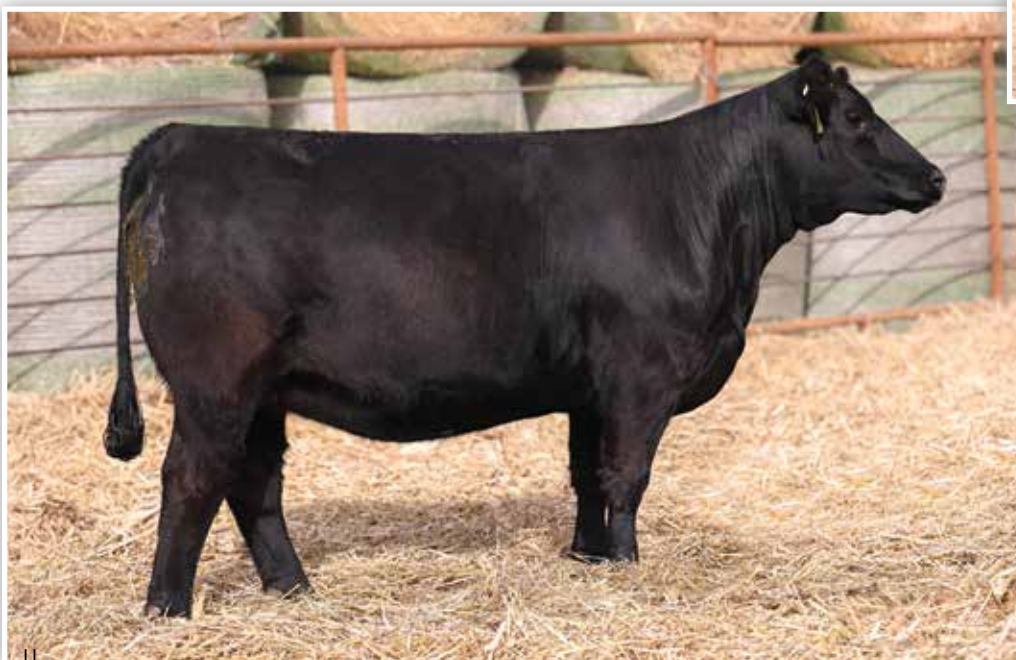
LOT 50 - BFJV RUTH'S HARD RIGHT K246

A moderate framed, bold ribbed, easy fleshing female that is sired by OMF Hard Right H21. The H300 daughters offer exceptional volume and capacity, without sacrificing structural integrity and eye appeal.