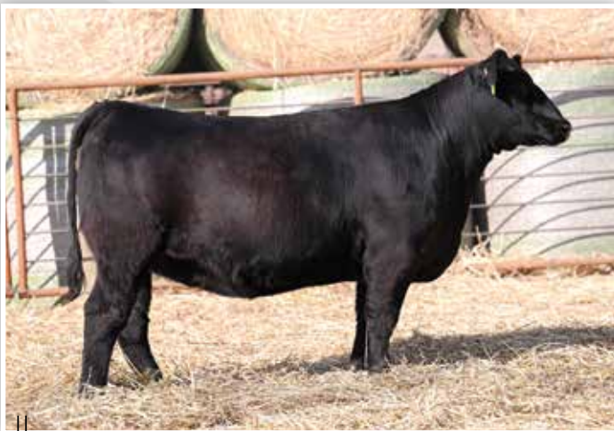
LOT 53 - BFJV MS HARD RIGHT K225