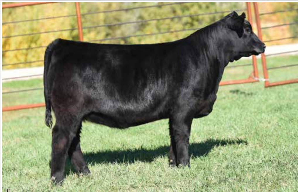
LOT B4 - BFJV GOOD TIMES FOREVER L03

Here is a pair of ET flushmate sisters that are also full sisters to the lot A5 herd sire prospect, BFJV Good Times L346. They are sired by the popular and highly proven STAG Good Times 201 ET and supported by the everlasting influence of the legendary Lazy H Bar Forever Lady 5001 cow family! The dam of this pair of females is sired by S A V Brave 8320 and is a direct daughter of the prolific 5001 donor. The genetic relevance that this pair of sisters brings to the table is simply unparalleled. Their pedigree aligns the influence of FCF Proven Queen 419, SCC Phyllis 052, and Lazy H Bar Forever Lady 5001... what more could you ask for?!