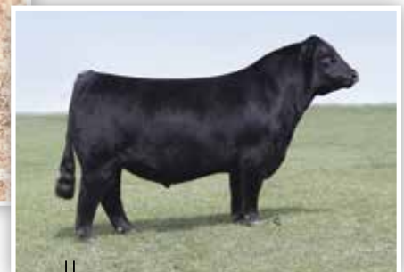
JBSF LOGIC 5E - SIRE OF LOT 45

K262 is sired by JBSF Logic 5E, a son of W/C Relentless 32C that is backed by the iconic Brooks Steel Magnolia X57. He is an ET flushmate brother to the 2019 AJSA National Classic Grand Champion and Reserve Grand Champion Purebred Simmental Heifers! This full faced baldy is a must see on sale day if you're serious about making the next generation of SimAngus cattle better...Bid with confidence here!