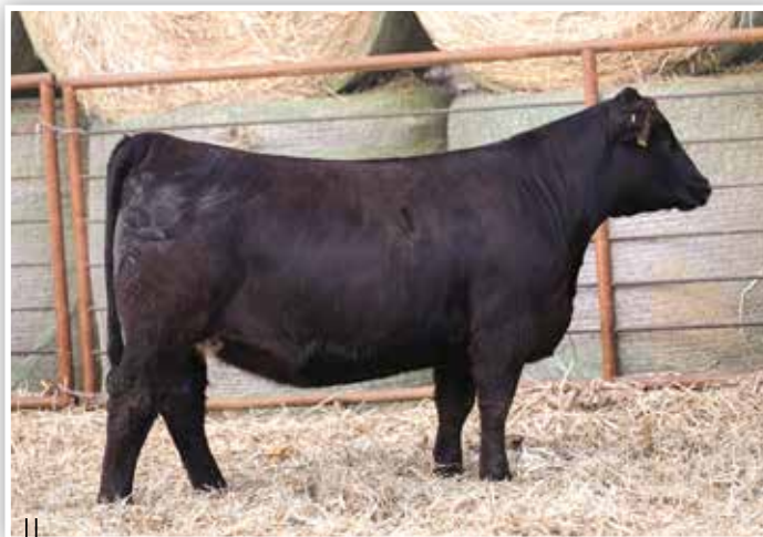
LOT 6 - BFJV MS REMEDY K208

K208 is another prime example of why SO Remedy 7F has become one of the most popular sire options in the business! Huge centered, sound footed, and correct in her angles. This brood cow in the making has the credentials to propel any breeding program forward.