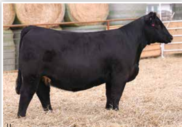
BFJV RUTH'S REMEDY K243 DAUGHTER OF LOT 99 - SHE SELLS AS LOT 1