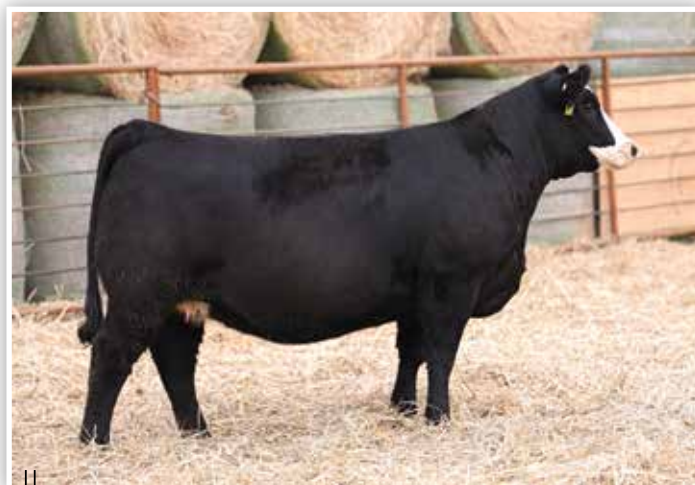
LOT 40 - BFJV MS CYCLONE K206

K206 is a high capacity daughter of W/C Cyclone 385H that offers a captivating look of maternal excellence. Her perfectly etched blaze face is further complimented by the mass and capacity that she possesses through the center portion of her body cavity. We love the type and kind of female that she represents!