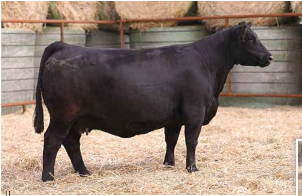
LOT 104 - KBC MISS LOADED 9275G