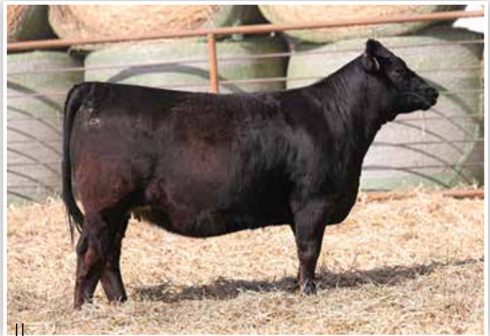
LOT 60 - BFJV MS HIGH RISE K203

K203 is long bodied, smooth made, and robust through her mid rib. Another daughter of Conley High Rise F3 that is safe to FRKG Classic 948K sexed female semen!