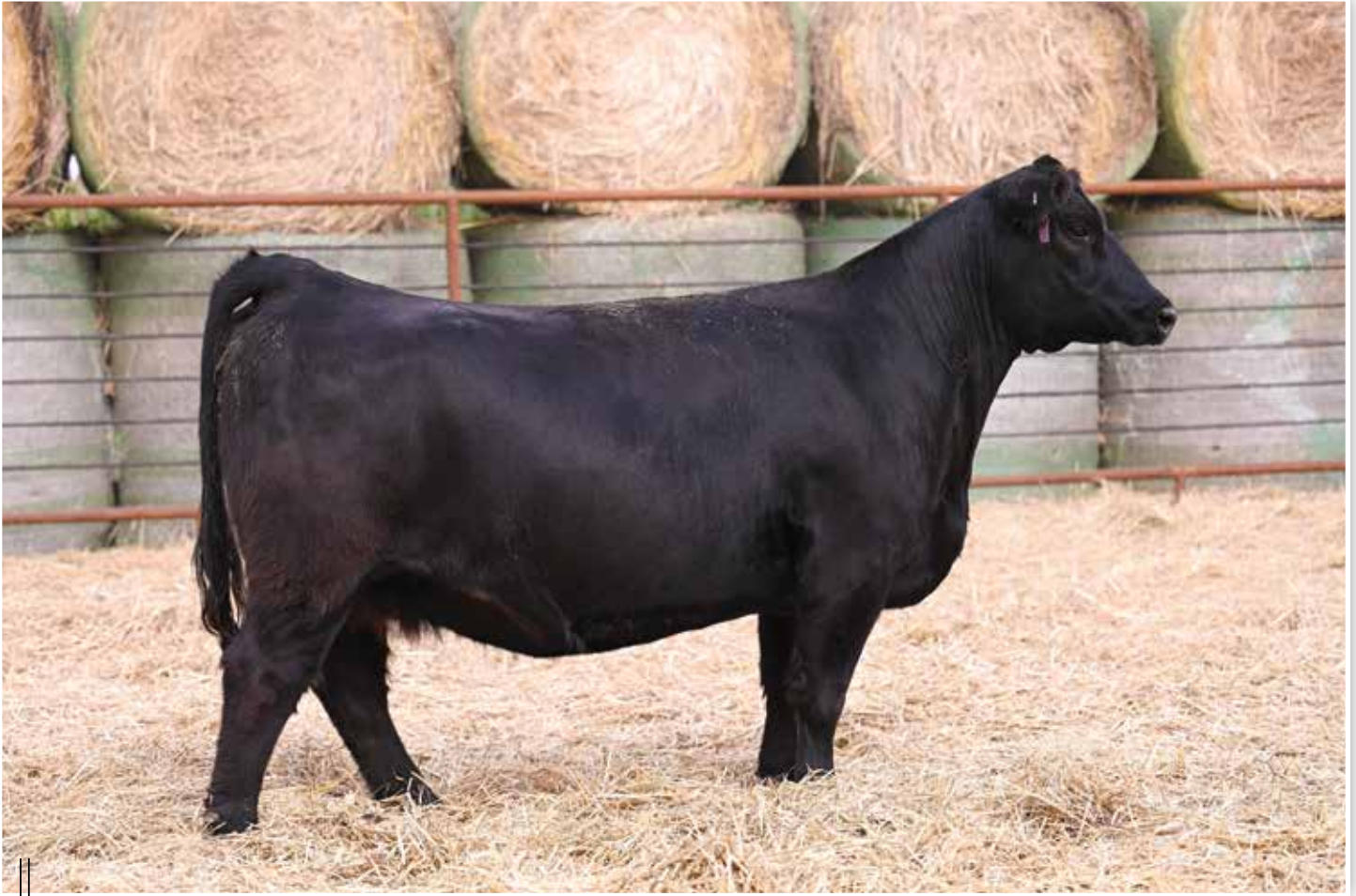
LOT 114 - BFJV MS SAVAGE H5