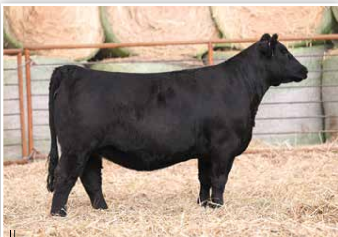
LOT 8 - BFJV MS REMEDY K239

One of the most elegant designed females in the entire sale offering! K210 is an eye appealing daughter of SO Remedy 7F that is tremendous in terms of her depth and spring of rib shape. She is developing a picture perfect udder as well. Safe to the $100,000 Conley High Rise F3 with a confirmed heifer pregnancy!