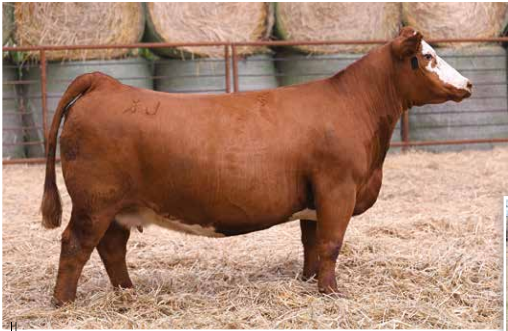
LOT 80 - KBC LIMIT SUGAR 9276G

Elite presence, shape, and quality can all be found in this good looking red baldy female that is sired by the W/C Loaded Up 1119Y son, GKW Limit Up. Her dam, BF Miss Sugar Shack is backed by the influence of SVF Steel Force S701, Meyer Ranch 734, and B C Lookout 7024. The dam of this female was bred in the BF Black Simmentals program of Auburn, Nebraska. She is safe in calf with a Purebred heifer calf on the way sired by FRKG Classic 948K!