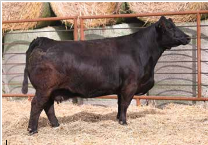
LOT 127 - SS BIANCA