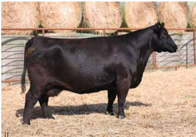
LOT 190 - BFJV MS 372