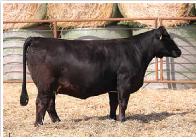
|| LOT 121 - BFJV MS SAVAGE J1519

SFI Savage D20 in our opinion is one of the Simmental breeds most underutilized sires, the sets of females he continues to generate for us are breathtaking. He consistently adds cool white markings, rib shape and bone circumference, we think that as the females continue to approach their prime years of production their value will only increase.