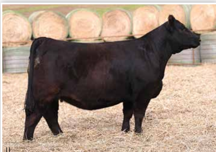
LOT 15 - BFJV MS REMEDY K256

One of the very few blaze faced daughters of SO Remedy 7F that we had born in Mapleton, Iowa! In addition to her color pattern, the extra volume and capacity that she offers is what truly sets her apart. A soft bodied, moderate framed female that personifies the brood cow fundamentals. She too is safe in calf to Conley High Rise F3 sexed female semen!