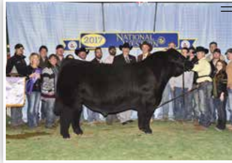
TL BOTTOMLINE $300,000 SIRE OF LOT 93

F301 is a powerful daughter of the $300,000 TL Bottomline, the many time champion that has left behind a stellar set of daughters in production across the nation. TL Bottomline was selected as the 2016 American Royal and 2016 NAILE Grand Champion Purebred Simmental Bull and the 2017 NWSS Reserve Grand Champion Purebred Simmental Bull. She is confirmed safe in calf to the $620,000 STCC Tecumseh 058J for a huge return!