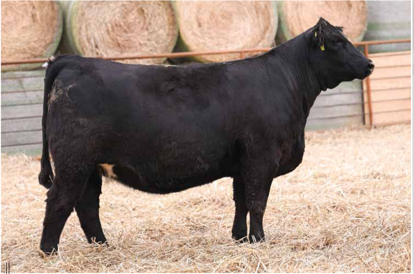
LOT 65 - BFJV MS LEDGER K269