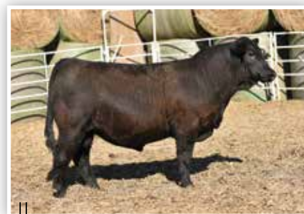
BFJV SHANIA'S LEDGER J196 FULL SISTER TO LOTS 87-90