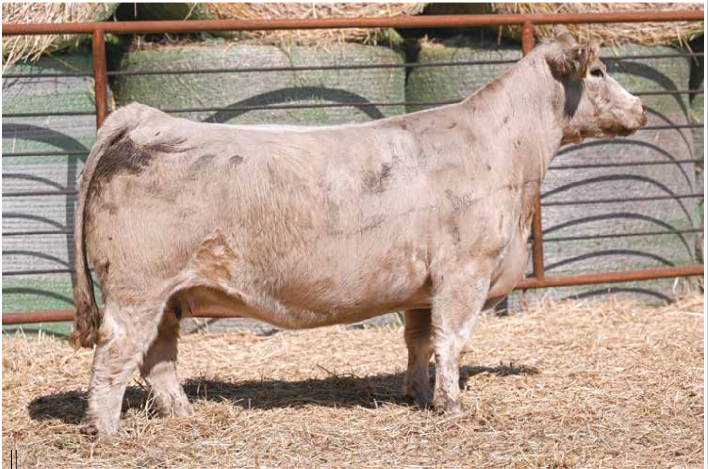
LOT 160 - BFJV MS SMOKE SHOW 001