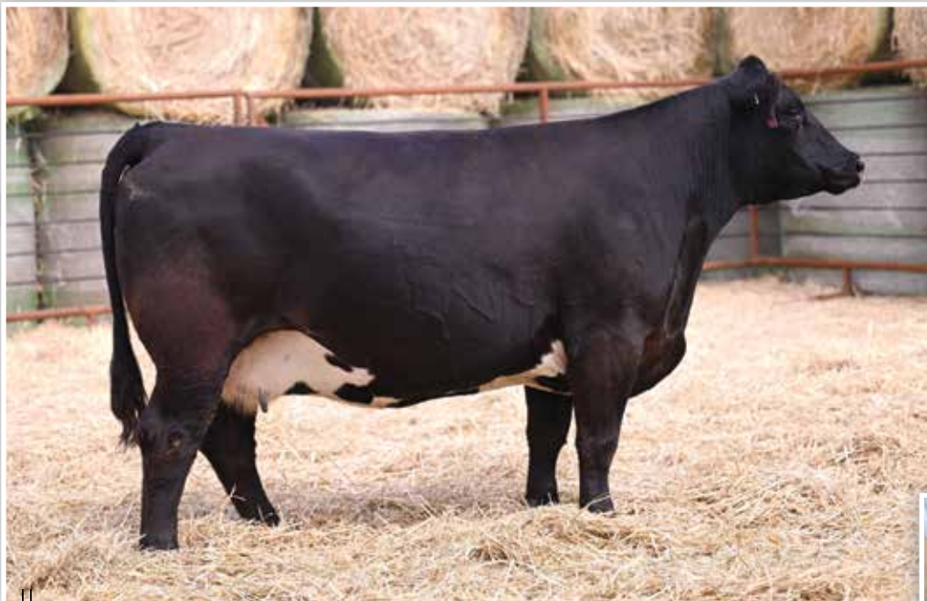
LOT 133 - BFJV VICTORIAS MARGIN F312

This daughter of BJFV Margin D9040 could easily be one of the most phenotypically elite animals in our entire bred female offering, this one's build is so intriguing. The way she combines an eloquent and square topside of her skeleton with a robust and overwhelming bottom half puts her in another category in our opinion. Add the splashes of chrome and mating to In God We Trust and we think the opportunity for quick ROI here is big time!