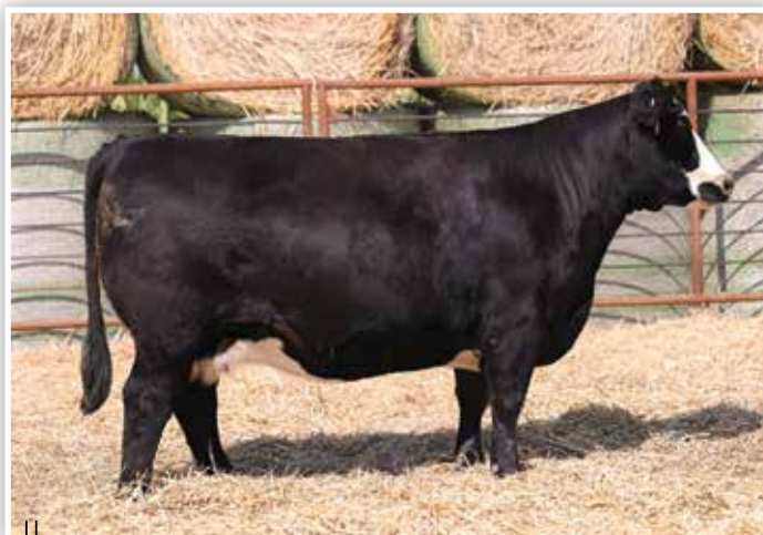
LOT 116 - BFJV MS SAVAGE H292

A bigger framed, extra bold and massive daughter of the SFI Savage D20 sire that is perfect marked and structured. Her body shape and muscle shape is impressive, and the surface area she marks with her step is large. Bred up for an early February heifer calf by our new herdsire, FRKG Classic 948K.