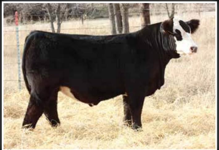
W/C BULLSEYE 3046A - SIRE OF LOTS 108-112

AI Sire: TL LEDGER (ASA: 3240219) | AI Date: 7/9/23 | Due: 4/16/24