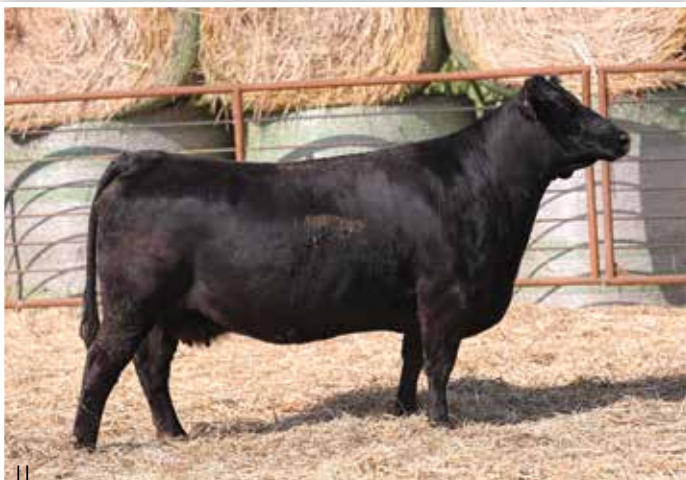
LOT 192 - BFJV MS 288