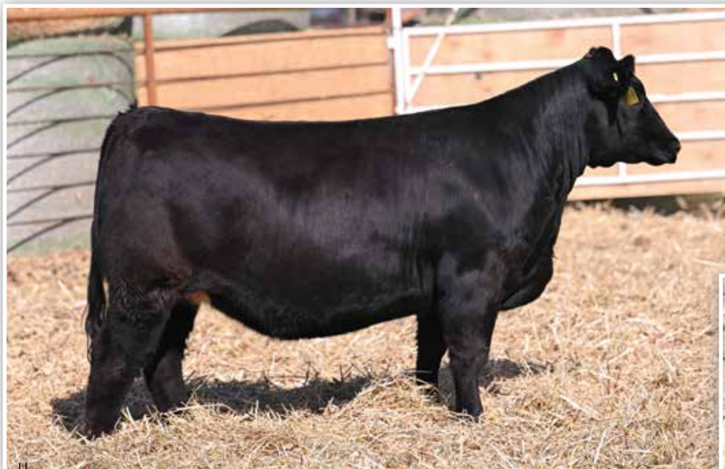
LOT 47 - BFJV MS NIGHT WATCH K252