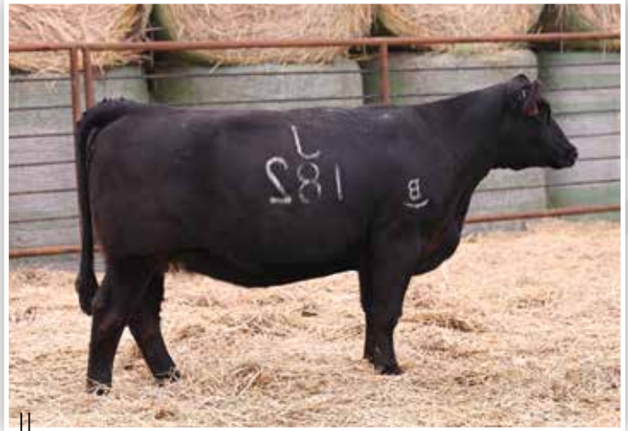
|| LOT 130 - BFJV MS J182

BFJV Ms J182 is a purebred female that comes with a rugged set of running gear, is extra long spined and sports a genomics package that ranks impressive for low birth and curve bending growth. She carries two shots of both Miss Werning KP 8543U and Kenco Miley Cottontail in the first three generations of her pedigree. Consistency can be assumed here.