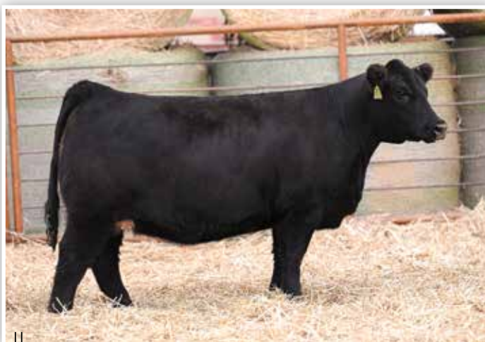
LOT 11 - BFJV MS REMEDY K235

If you're looking for a female that has the extra shape, power, bone, and substance then K235 will be at the top of your short list come sale day! BFJV Ms Remedy K235 is a moderate framed, robust bodied, low input daughter of SO Remedy 7F. She exemplifies the fundamentals, while offering as much foot and bone mass as any female within her sire group. This mating to Conley High Rise F3 is sure to be a homerun!