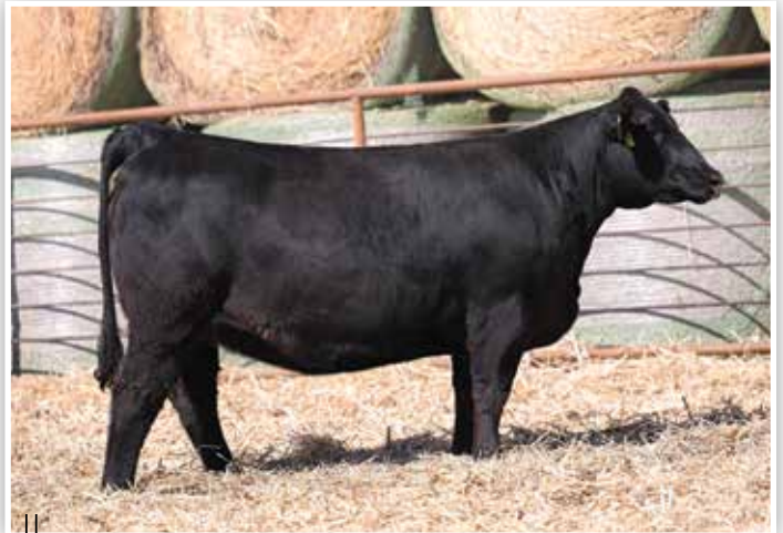
LOT 18 - BFJV MS REMEDY K241

Here is another daughter of SO Remedy 7F that deserves serious consideration on sale day. She is safe in calf to Conley High Rise F3 sexed female semen for a BIG return on investment!