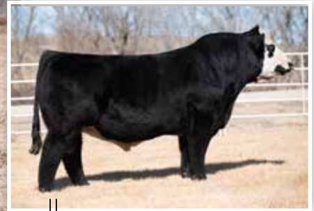
SFI SAVAGE D20 SIRE OF LOT 82