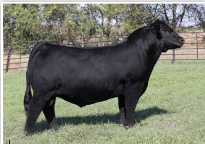
FRKG CLASSIC 948K - SERVICE SIRE TO LOT 27

A striking blaze faced daughter of W/C Bankroll 811D that offers a show stopping look of quality from the side. She is so sleek and feminine about her front third, bold ribbed, and offers a stout hip and pin set from behind.