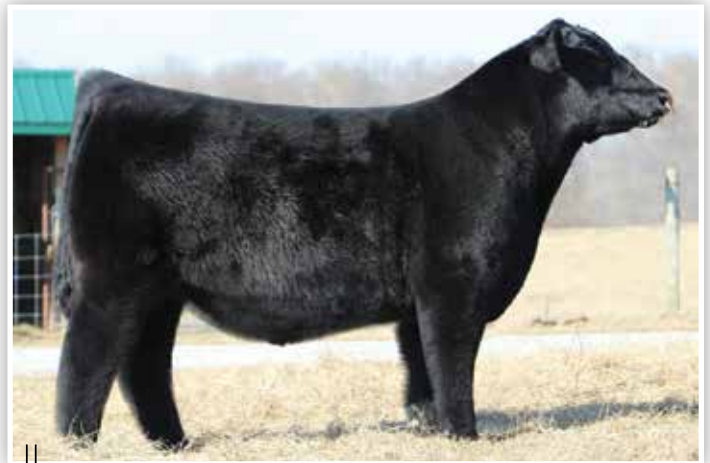
SCC SCH 24 KARAT 838 - SIRE OF LOT 149

276 is a direct daughter of the legendary SCC SCH 24 Karat 838, one of the most heavily utilized Angus AI sires of the decade! SCC SCH 24 Karat 838 has done an astonishing job in the Angus breed siring high sellers and champions across the nation, however his ability to cross breed lines might be his biggest accolade! 276 is backed by the influence of the ASHW Who Da Man x Monopoly genetic combination, which alone needs no introduction to the business. 276 is a massive bodied, stout pinned, big hipped heifer that offers a look of true maternal excellence with added eye appeal. She is safe in calf to the $210,000 FRKG Classic 948K with sexed female semen. A donor in the making with unmatched earning potential!