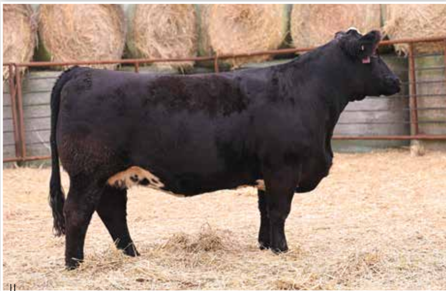
LOT 98 - TMAS CKCC MS HARMONY 0667H