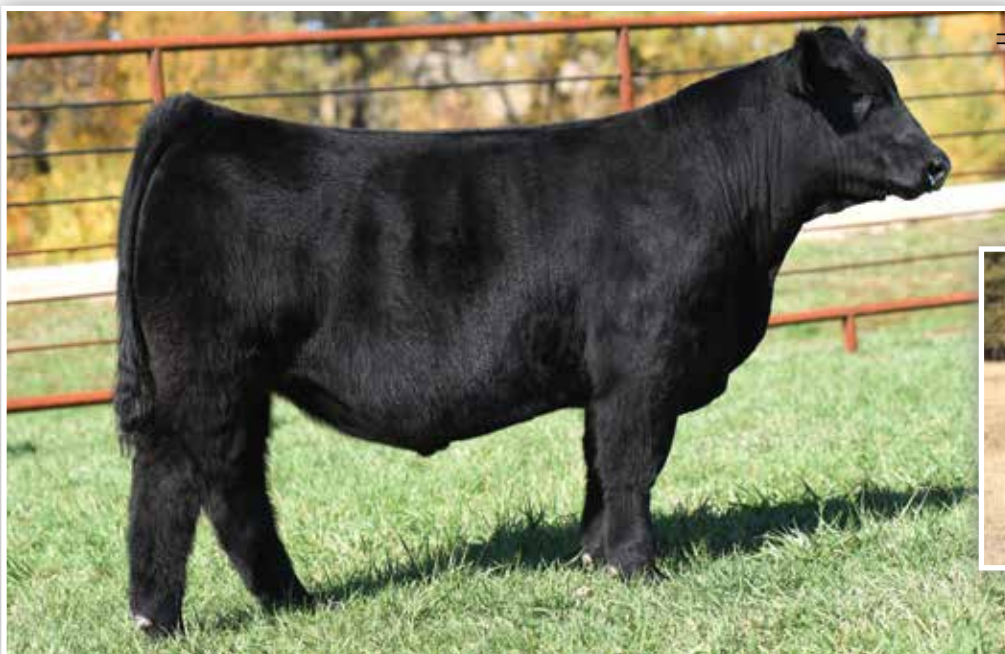
LOT A5 - BFJV GOOD TIMES L346

The lone red hided bull in the offering that is unmatched in terms of substance, quality, and genetic value! BFJV SAM K338 is a massive bodied, big topped, square ended fall yearling herd sire prospect that is also one that could be ready for turn out this winter on a set of fall calving females. His dam is sired by WAGR Driver 706T, one of the maternal icons in the Simmental breed. His maternal granddam is a FULL SISTER to BFJV Margin D9040, a proven herd sire that is owned with the Loudon family of Iowa. We love the fundamental correctness that he brings to the table.