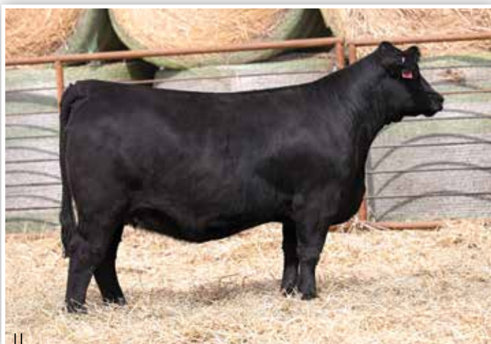
LOT 9 - BFJV MS REMEDY K249

K239 offers a unique blend of power and femininity, while maintaining a brood cow look from the side. Here is a daughter of SO Remedy 7F that is as long and smooth as any female in the offering, while maintaining a stout hip and pin set, square build, and a look of balance that simply cannot be denied. This three-quarter blood female is supported by a daughter of the triple crown winning MR HOC Broker!