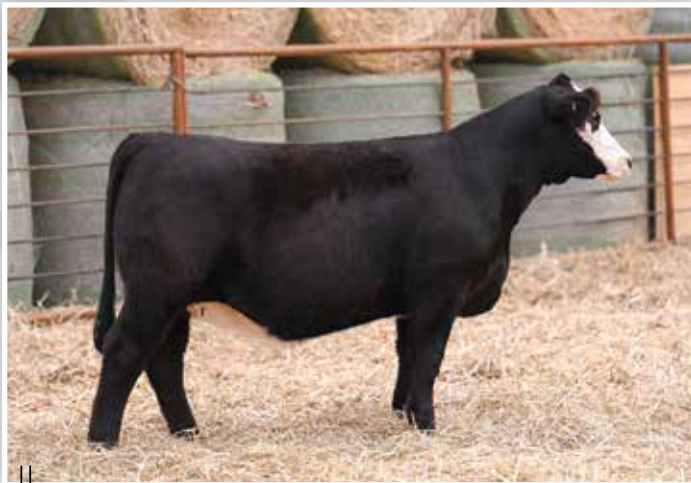
LOT 41 - BFJV MS CYCLONE K205