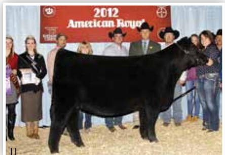
MS ROSIE DRIVER 1786Y 2012 AMERICAN ROYAL GRAND CHAMPION PERCENTAGE SIMMENTAL HEIFER AND FULL SISTER TO MATERNAL GRANDDAM OF LOT 98