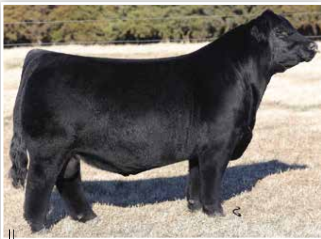
JSUL SOMETHING ABOUT MARY 8421 SIRE OF LOTS A2-A4