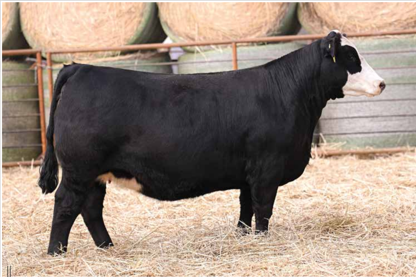
LOT 23 - BFJV MS BANKROLL K200