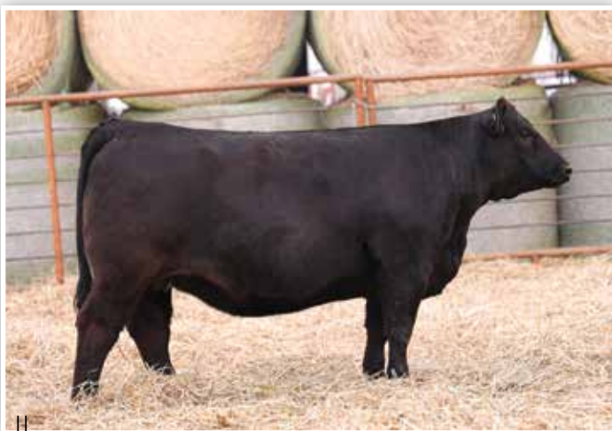
LOT 55 - BFJV MS HARD RIGHT K290

Body, substance, and pin width... three things that K287 offers within this group of females. We love the easy keeping look of efficiency that she offers. This mating to the $250,000 TL Ledger is certain to add the extra look and eye appeal that will result in a huge return on investment!