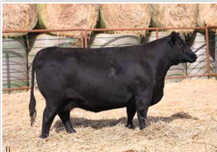
LOT 206 - BFJV MS 3200