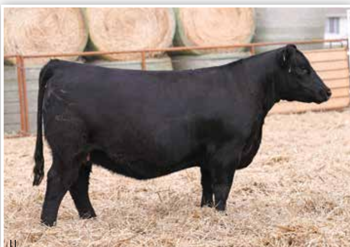
LOT 36 - BFJV MS CYCLONE K226

A daughter of the impressive W/C Cyclone 385H that offers the signature look and extension that he consistently stamps his progeny with time after time! A beautiful profiling female that is safe in calf to FRKG Classic 948K with a heifer calf on the way!