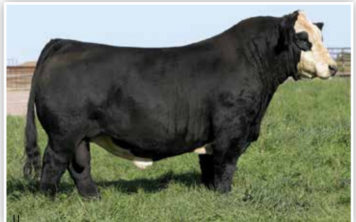
W/C BANKROLL 811D - $205,000 MATERNAL GRANDSIRE OF LOTS 1 & 2

Here is a full sister to K243 that offers the same look of quality and balance from the side as her ET flushmate sister. She is so long and smooth about her front third, clean chested, flat shouldered, and transitions into a three-dimensional forerib and center body shape. She is long and level hiped, big pinned, and sets to the surface with confidence. She's safe in calf to the resident herd sire at Bruhn Cattle Company, W/C Cyclone 384H!