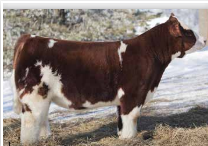
MAN AMONG BOYS - SIRE OF LOT 170

Hereford steer makers gather round this Man Among Boys sired cow! You may have noticed the regenerated demand for MAB semen, well that's because these females have been kicking it out of the park in production. She has all the extras when it comes to bone circumference, pin width, hair quality and eye appeal. The demand for the Hereford marked steers is only getting stronger.