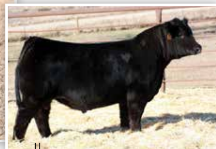
W/C NIGHT WATCH 84E $142,500 SIRE OF LOT 47