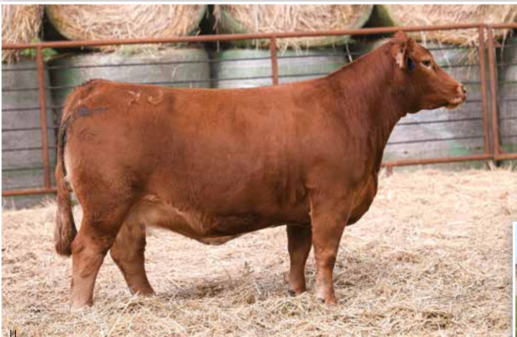
LOT 81 - KBC MISS LOADED 9280G

Another standout red hided brood cow that is sired by W/C Bankroll 8911D. Her dam is productive daughter of the triple crown winning MR HOC Broker, the dominant sire of champions and high sellers! She is one of the stoutest featured females in the sale. We have always admired the heaviness of structure, pin width, and genuine shape that she possesses. Another beautiful female safe in calf to the incredible STCC Tecumseh 058J!