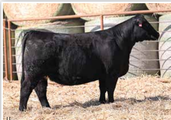
BFJV RUTH'S REMEDY K237 DAUGHTER OF LOT 99 - SHE SELLS AS LOT 2