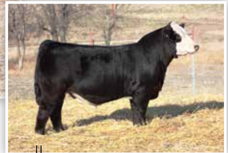
W/C LOADED UP 1119Y SIRE OF LOTS 104 & 105