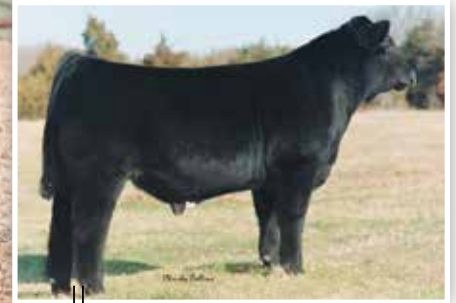
IRISH WHISKEY SIRE OF LOT 147

J183 is a direct daughter of the iconic Irish Whiskey, one of the most influential individuals in the history of the Maine-Anjou breed! Her striking blaze face only further enhances the eye appeal and presence that she offers from the side. Her captivating look and skeletal quality combines make her a truly elite breeding piece. She is safe in calf to the $250,000 TL Ledger!