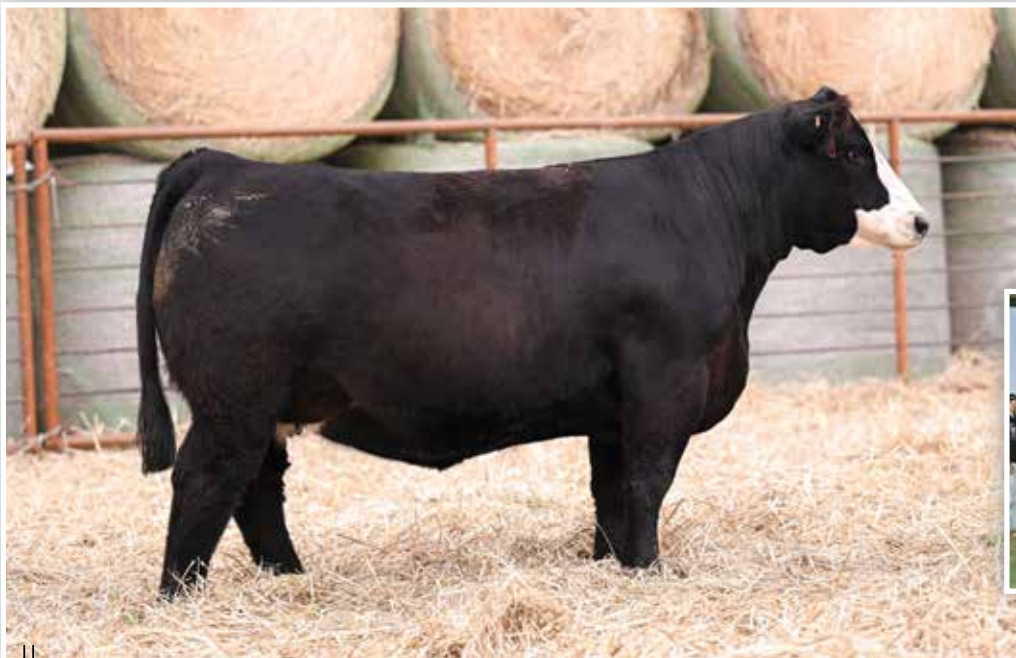
LOT 31 - PINNACLE PRICE J621

Stout, massive, and square built. J621 is a shapely Purebred Simmental female sired by W/C Pinnacle E80, the full brother to the $205,000 W/C Bankroll 811D. Her dam is sired by the two-time NWSS Grand Champion Purebred Simmental Bull, SC Pay The Price C11.