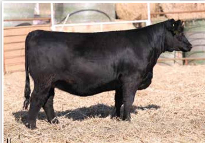
LOT 38 - BFJV MS CYCLONE K222

Long bodied, smooth made, and loaded with volume and shape. K222 is a daughter of W/C Cyclone 385H that offers the credentials of a role model brood cow prospect. She sells safe in calf to FRKG Classic 948K, the $210,000 son of the iconic SO Remedy 7F.