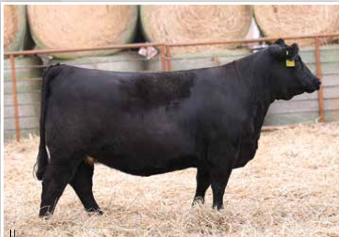
LOT 13 - BFJV MS REMEDY K218