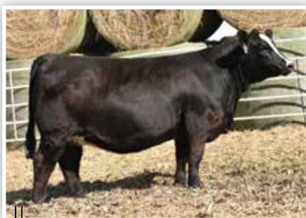
BFJV SHANIA'S LEDGER H061 FULL SISTER TO LOTS 87-90