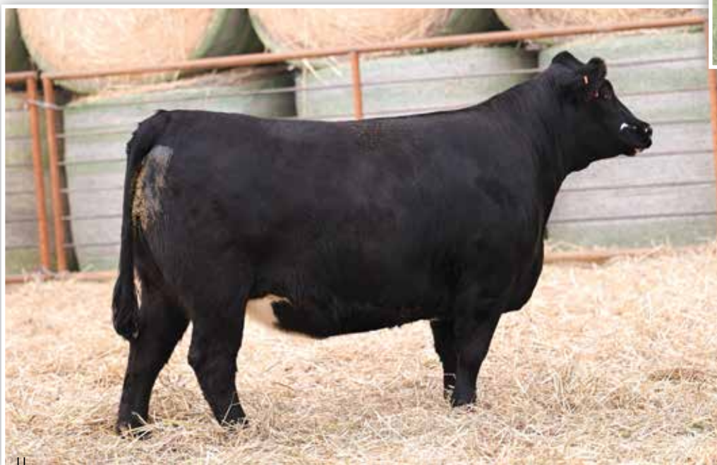
LOT 58 - BFJV MS HIGH RISE K273

This motley faced female is an absolute load! Huge bodied, easy keeping, and as productive and practical in her body style as any female in this offering. She is safe to sexed female FRKG Classic 948K semen with a heifer on the way!