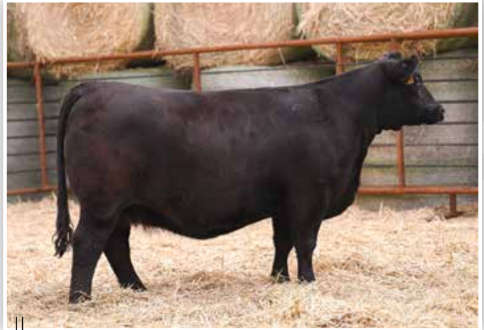
LOT 122 - BFJV MS SAVAGE J2010

I'm not sure if we will sell many females that can match the extreme mass, density and body shape of this SFI Savage D20 daughter. This young half blood cow is just as impressive in the flesh as her picture dictates, there is no questioning if this one will breed with power and dimension.