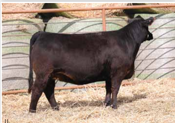
LOT 43 - BFJV MS CYCLONE K274

Stout, massive, and three-dimensional. K212 is one of the stoutest and highest volume females from the W/C Cyclone 385H sire group. Her striking blaze face only further enhances the fundamental correctness that she offers. A true brood cow in the making!