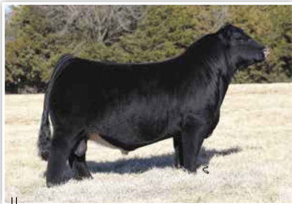
GEFF COUNTY O - SIRE OF LOT 73