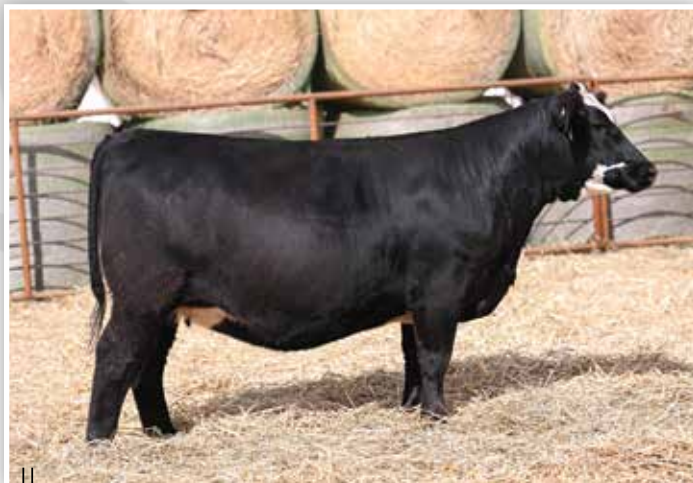
LOT 25 - BFJV MS BANKROLL K270