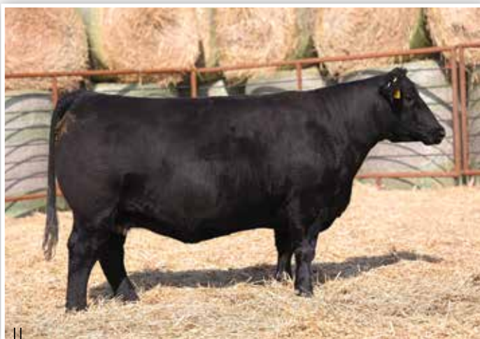
|| LOT 194 - BFJV MS 801