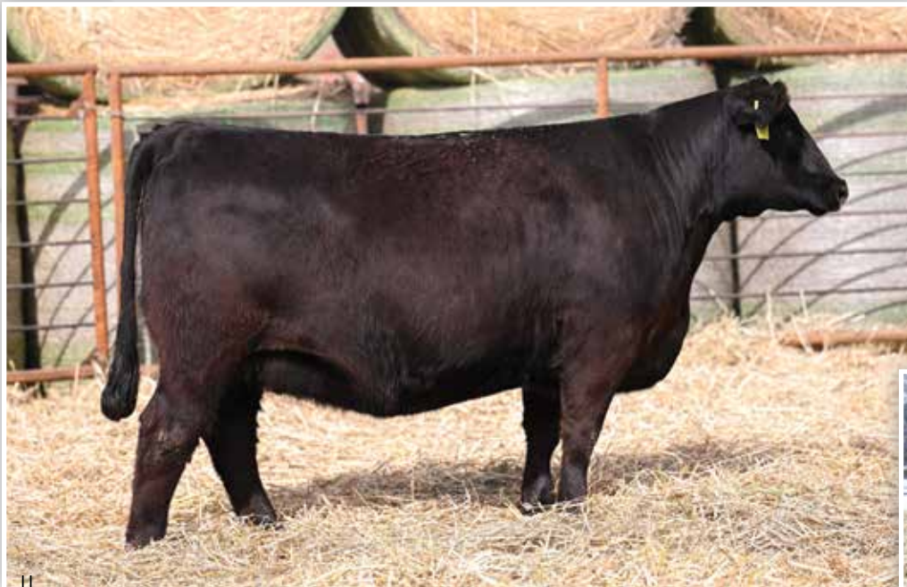
LOT 70 - BFJV MS REVENANT K204

K204 is sired by the $100,000 TL Revenant, one of the premier young sires in the breed that is owned by Jim Bowling and associates. There is no denying the sheer presence and uniqueness that he stamps his progeny with every single time! Here is a daughter that is certain to turn heads on sale day. A huge bodied, easy fleshing female that offers a superior structural build. She is safe in calf to the $210,000 FRKG Classic 948K... bid to own!