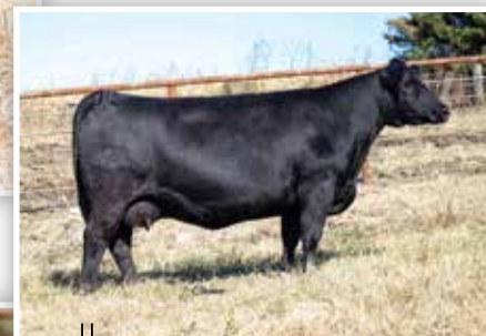
HOOK'S ANGEL 11A PATERNAL GRANDDAM OF LOTS 48-55

STOUT... be sure to check out this OMF Hard Right H21 daughter if you like your cattle with a little extra punch! A massive ribbed, easy fleshing body style that is complimented by the extra foot and substance of bone. She is confirmed safe in calf to the $210,000 FRKG Classic 948K with a heifer calf!