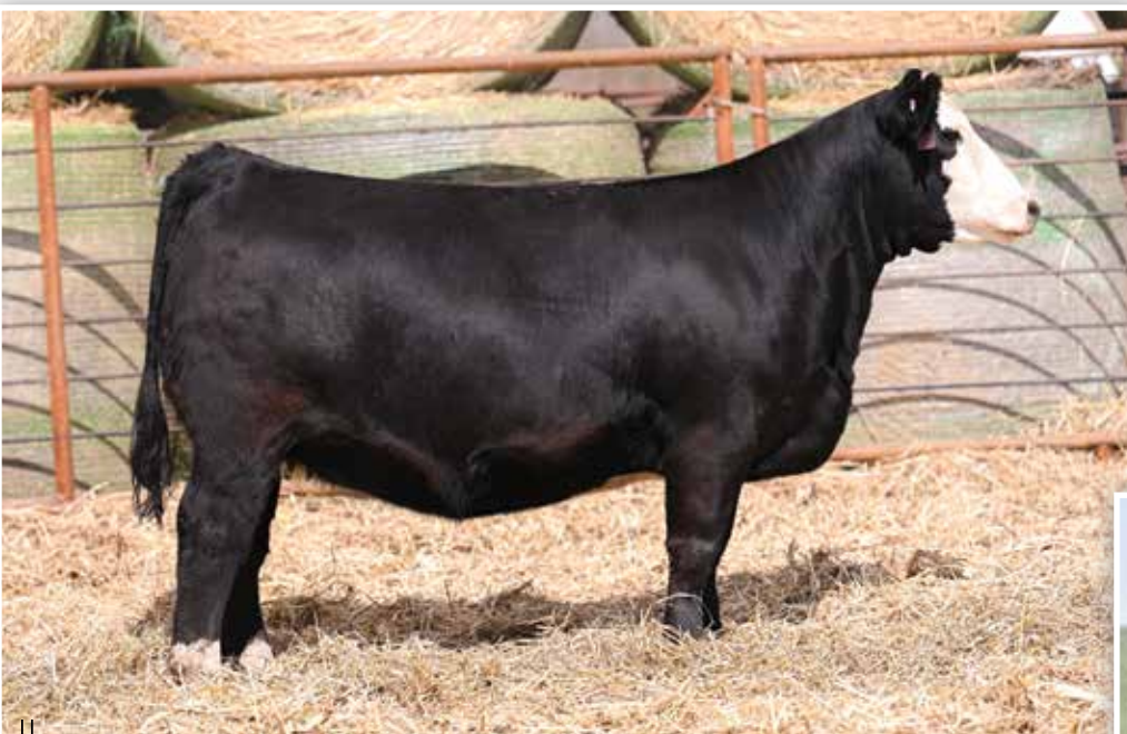
LOT 45 - BFJV MS LOGIC K262

K262 is sired by JBSF Logic 5E, a son of W/C Relentless 32C that is backed by the iconic Brooks Steel Magnolia X57. He is an ET flushmate brother to the 2019 AJSA National Classic Grand Champion and Reserve Grand Champion Purebred Simmental Heifers! This full faced baldy is a must see on sale day if you're serious about making the next generation of SimAngus cattle better...Bid with confidence here!