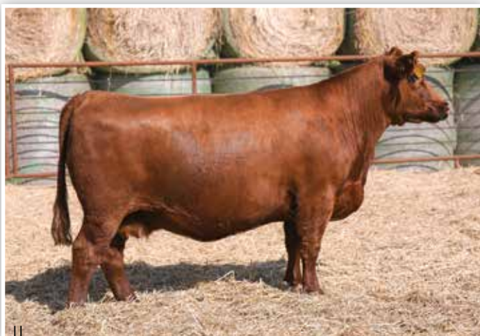
LOT 163 - BFJV MS 647

Ultra-dimensional and shapely, it's amazing how we have kept so much density in these Simmental and Red Angus influence cattle whilst adding extra look and structural soundness. A prime example of the mold we have built this cowherd around, the mating opportunities remain wide open, but you can trust in the genetics that have delivered us to this point. Her kind mates up perfectly with W/C Cyclone 385H.