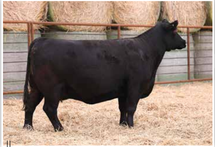
LOT 152 - BFJV MS E063

A big ribbed, high capacity female that offers an easy fleshing and productive look. She is sound footed, good uddered, and offers a strong look of maternal functionality. She is carrying a heifer calf by the $250,000 TL Ledger!