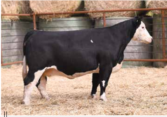
LOT 155 - BFJV MS 8670