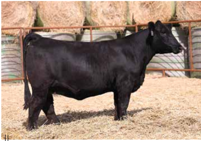
LOT 181 - BFJV MS J20