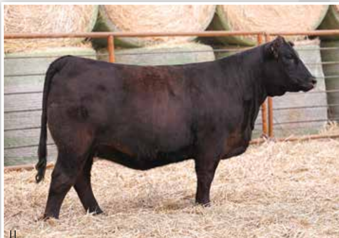
LOT 10 - BFJV MS REMEDY K279

BFJV Ms Remedy K279 is one of the stoutest, boldest, most three-dimensional daughters of SO Remedy 7F in the sale. We love the extra power and capacity that she brings to the table. An easy fleshing, low input female that will be a role model brood cow in production.