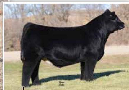
BFJV MARGIN D9040 MATERNAL GRANDSIRE OF LOT 32

Another daughter of W/C Pinnacle E80 that will catch your attention on sale day! Check out the body mass and capacity that she offers. A true brood cow in the making!