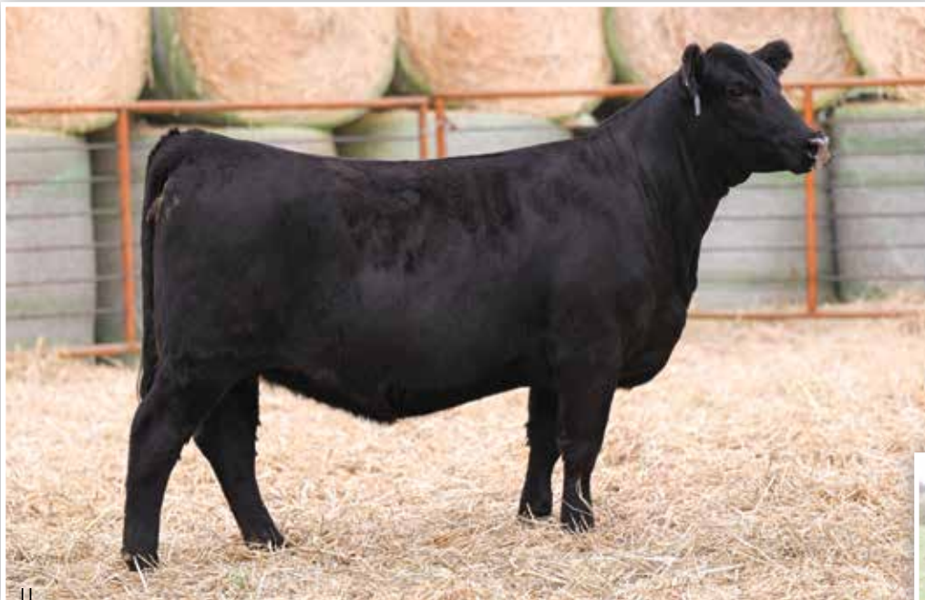
LOT 68 - BFJV MS LEDGER K263

A sleek made, ultra-refined, high quality daughter of TL Ledger. She is so smooth shouldered, clean chested, and offers a look of quality from the side that is sure to catch your attention. This female has been mated to W/C Cyclone 385H, the captivating red baldy herd sire at Bruhn Cattle Company!