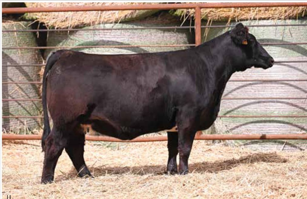
LOT 109 - BFJV MS BULLSEYE J8150