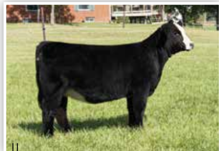
$13,500 FULL SISTER TO LOT A1