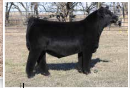
STCC TECUMSEH 058J $620,000 SERVICE SIRE TO LOT 81

Elite presence, shape, and quality can all be found in this good looking red baldy female that is sired by the W/C Loaded Up 1119Y son, GKW Limit Up. Her dam, BF Miss Sugar Shack is backed by the influence of SVF Steel Force S701, Meyer Ranch 734, and B C Lookout 7024. The dam of this female was bred in the BF Black Simmentals program of Auburn, Nebraska. She is safe in calf with a Purebred heifer calf on the way sired by FRKG Classic 948K!