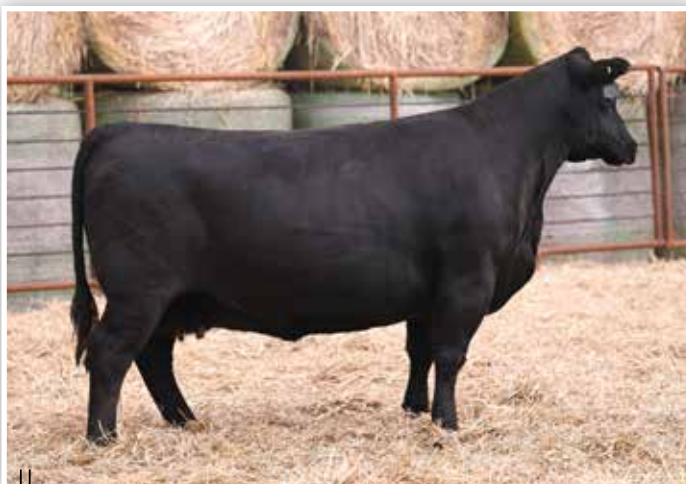
|| LOT 196 - BFJV MS 825