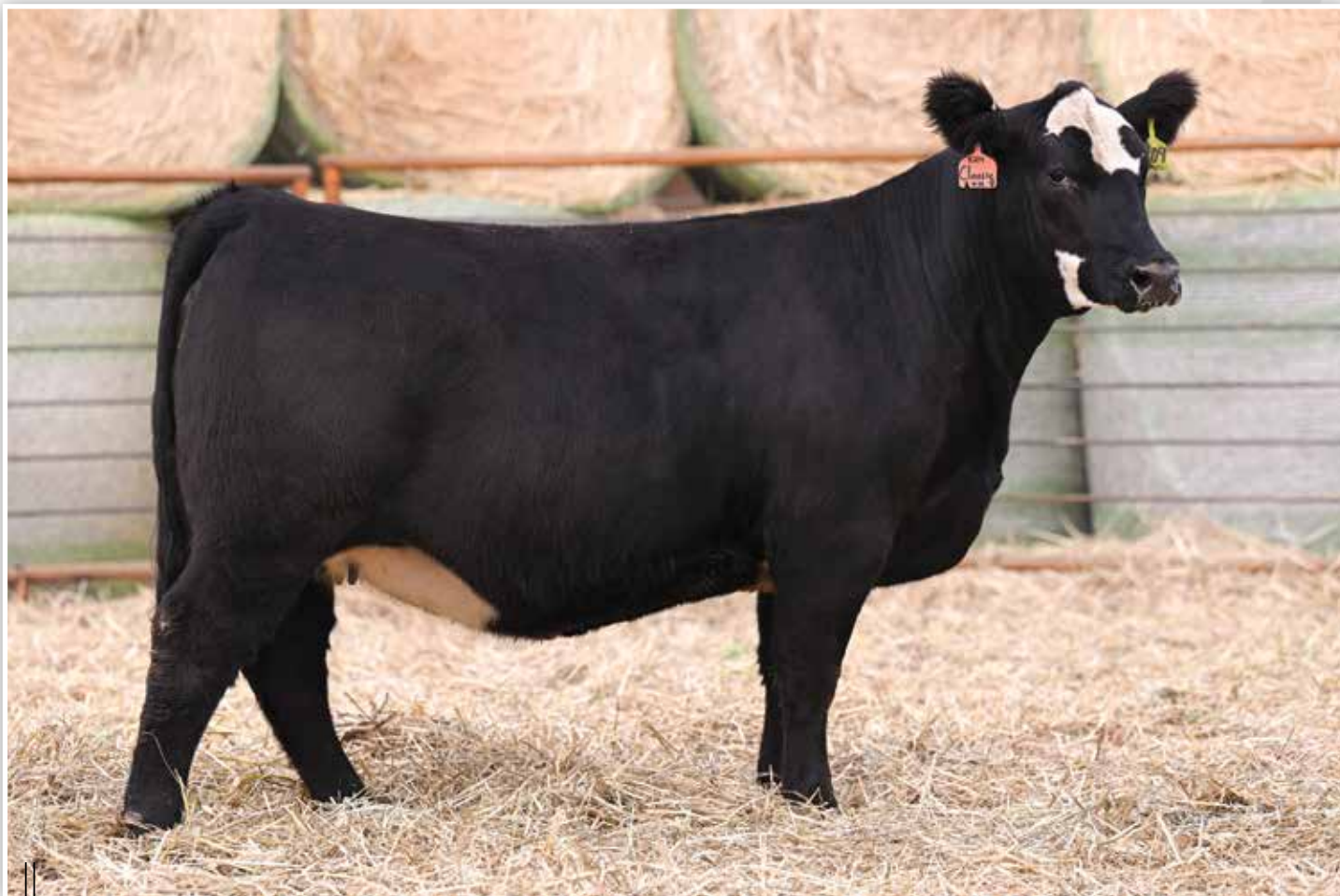
LOT 24 - BFJV MS BANKROLL K209

K209 is stunning brockle faced daughter of the $205,000 W/C Bankroll 811D. She is high tying in her neck attachment, feminine featured, and square built at the surface. We have always loved the abundance of body mass, volume, and capacity that she possesses. She is confirmed safe to the $210,000 FRGK Classic 948K with sexed heifer semen. There is no denying her presence, stoutness, and overall quality – a true sale feature!