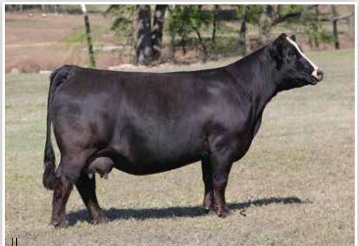
CONLEY SHEZA STAR D3 $120,000 PATERNAL GRANDDAM OF LOTS 56-61

K257 is a long bodied, big footed, heavy structured female that offers a fundamentally correct build a body style. Safe to FRKG Classic 948K sexed female semen!