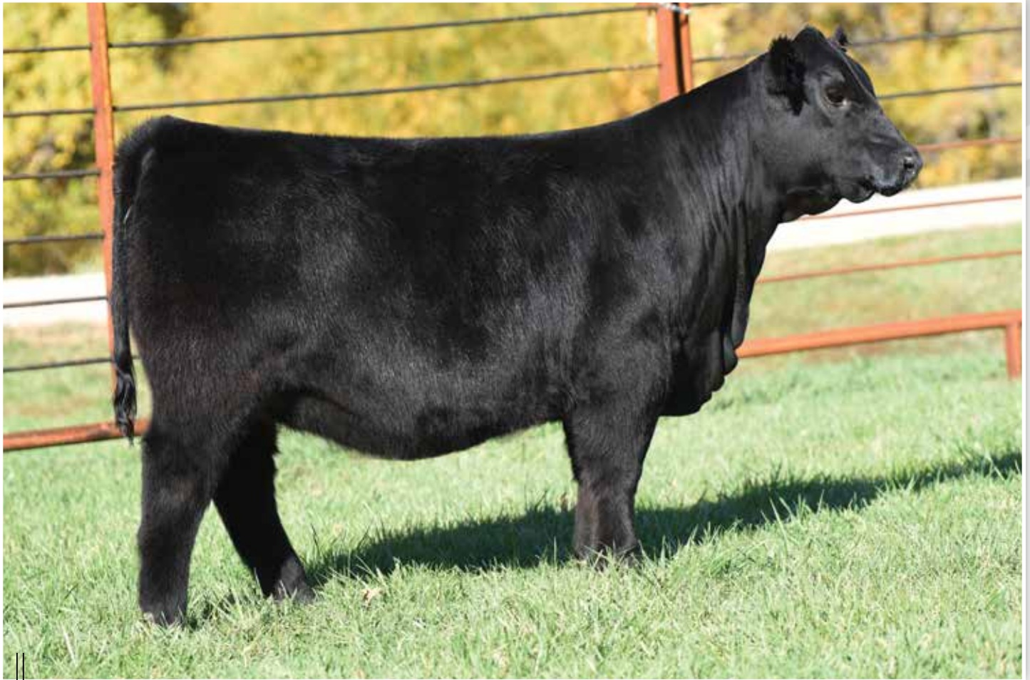
LOT B2 - BFJV GOOD TIMES QUEEN L81