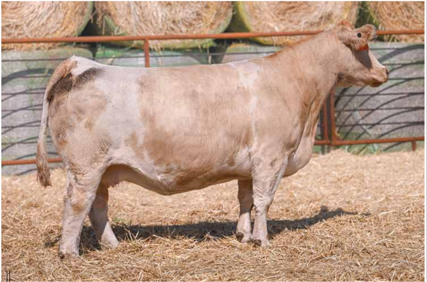
LOT 159 - BFJV MS DAKOTA GOLD 710

The Dakota Gold daughter you will find tagged 159 is as stout and heavy muscled as any cow that will sell on November 18th, there is no exaggeration in saying that she is an absolute beast! This one has unlimited potential to raise southern show steers and needs to be flushed to In God We Trust at the first chance you get.