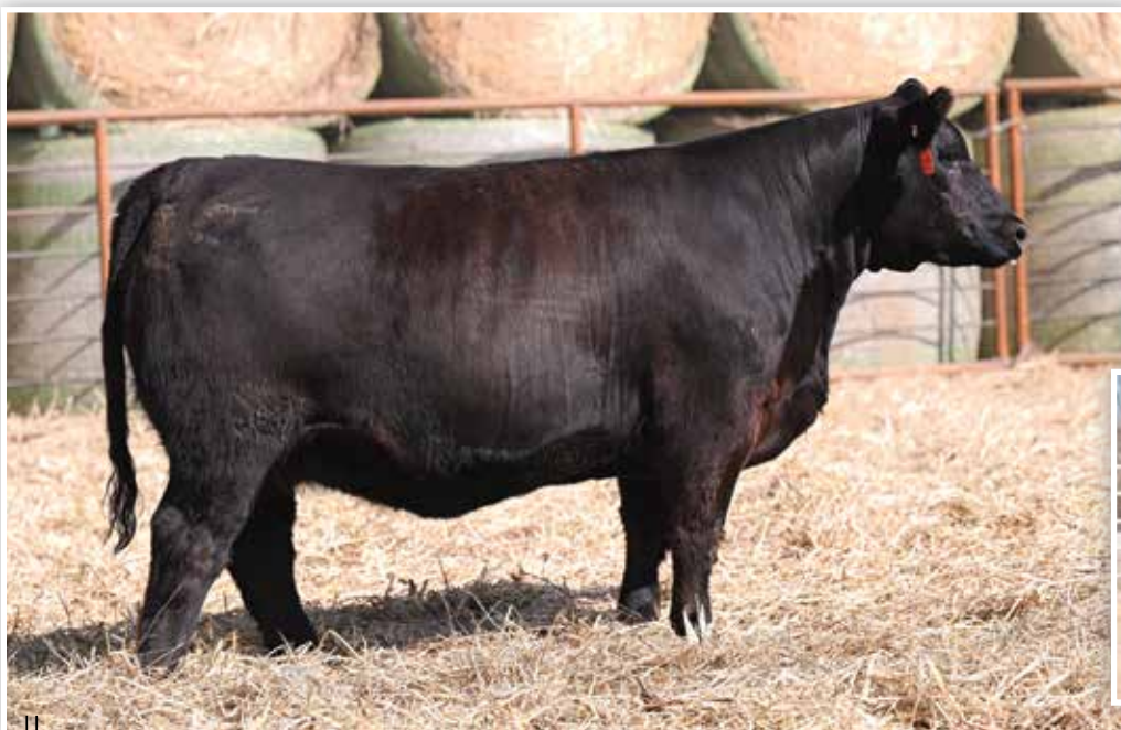
LOT 71 - BFJV MS SAVAGE K220

This half-blood daughter of SFI Savage D20 is a productive designed female with an abundance of rib shape and capacity. She too sells safe in calf to FRKG Classic 948K with a heifer calf on the way!