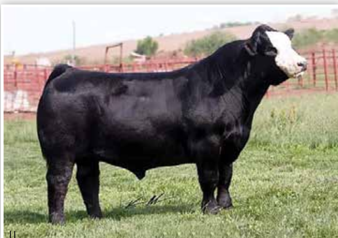
REMINGTON SECRET WEAPON 185 - SIRE OF LOT 128

SS Bianca stems from a very recognizable lineage for fellow Simmental enthusiasts. Her maternal granddam Kenco Miley Cottontail has her name etched among the legends of the breed, she has over 125 progeny to her name in the ASA registry and is the dam of SS/PRS High Voltage 244X. You can in fact trace the Miley Cottontail lineage back to JM BF H25, the dam of the legendary MR HOC Broker. Power in the blood is a guarantee with this female.