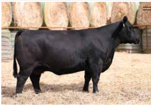
LOT 220 BFJV MS 16

AI Sire: TL LEDGER (ASA: 3240219) | AI Date: 6/25/23 | Due: 4/2/24