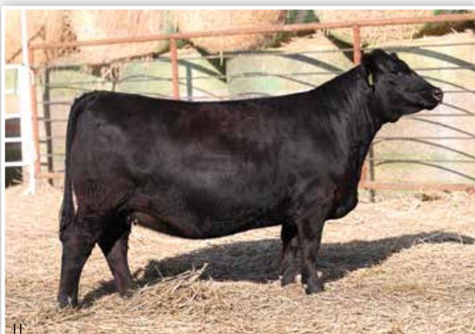
LOT 64 - BFJV MS THOR K217