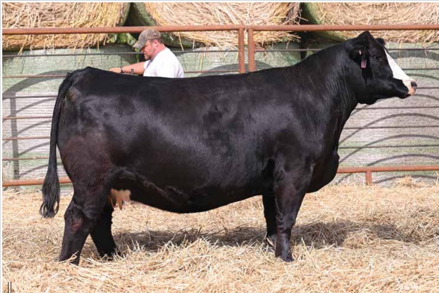
LOT 87 - BFJV SHANIA'S LEDGER H057