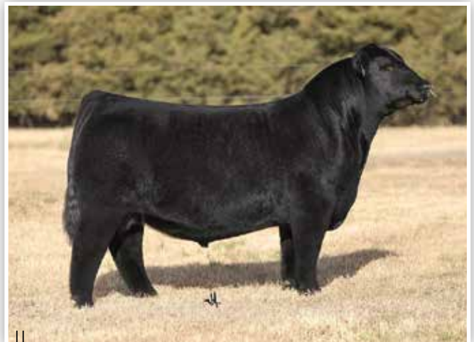
STAG GOOD TIMES 201 ET SIRE OF LOT B2

L81 is a big time brood cow prospect that is overwhelming in terms of her substance of body, heaviness of structure, and overall capacity. She is sired by the popular STAG Good Times 201 ET and backed by a tremendous daughter of Colburn Primo 5153. We love the natural sweep and progression of depth that she offers to her lower rib with the extra spring and shape up high. A big hipped, long sided female that is loaded with potential to generate elite Angus seedstock!