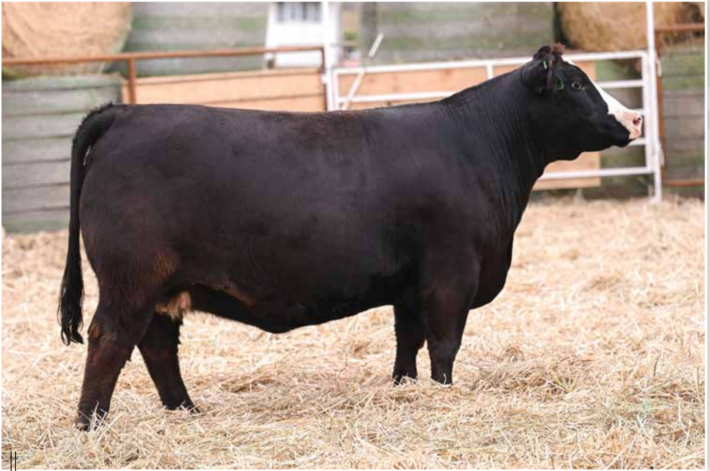
LOT 72 - BFJV MISS WHIZARD 17K