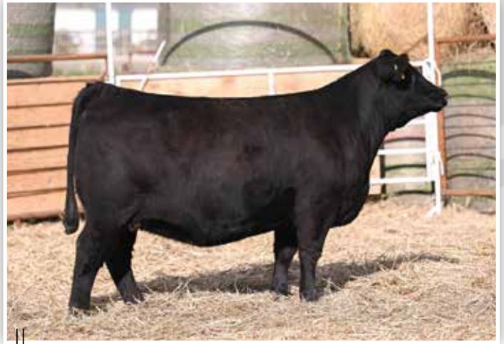
LOT 16 - BFJV MS REMEDY K278

K278 is bold bodied, deep sided, and as robust as any female within her sire group! Check out this brood cow in the making that offers a low input look of maternal function. She sells safe to Conley High Rise F3 sexed female semen... don't miss out here!