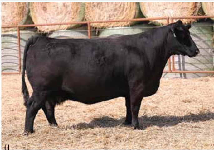
LOT 182 - BFJV MS 836