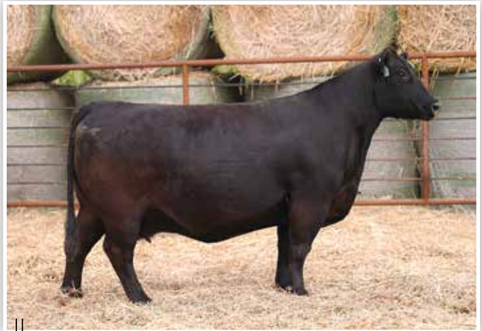
LOT 151 - BFJV MS 60

Here is a massive female that offers a look from the side that will stop you in your tracks! She ties her neck high at the top of her shoulder and transitions into a bold, three-dimensional forerib and center body shape. We love the hip and hind leg design that this female possesses. She is safe in calf to the baldy herd sire known as SFI Savage D20 with a herd bull prospect on the way!