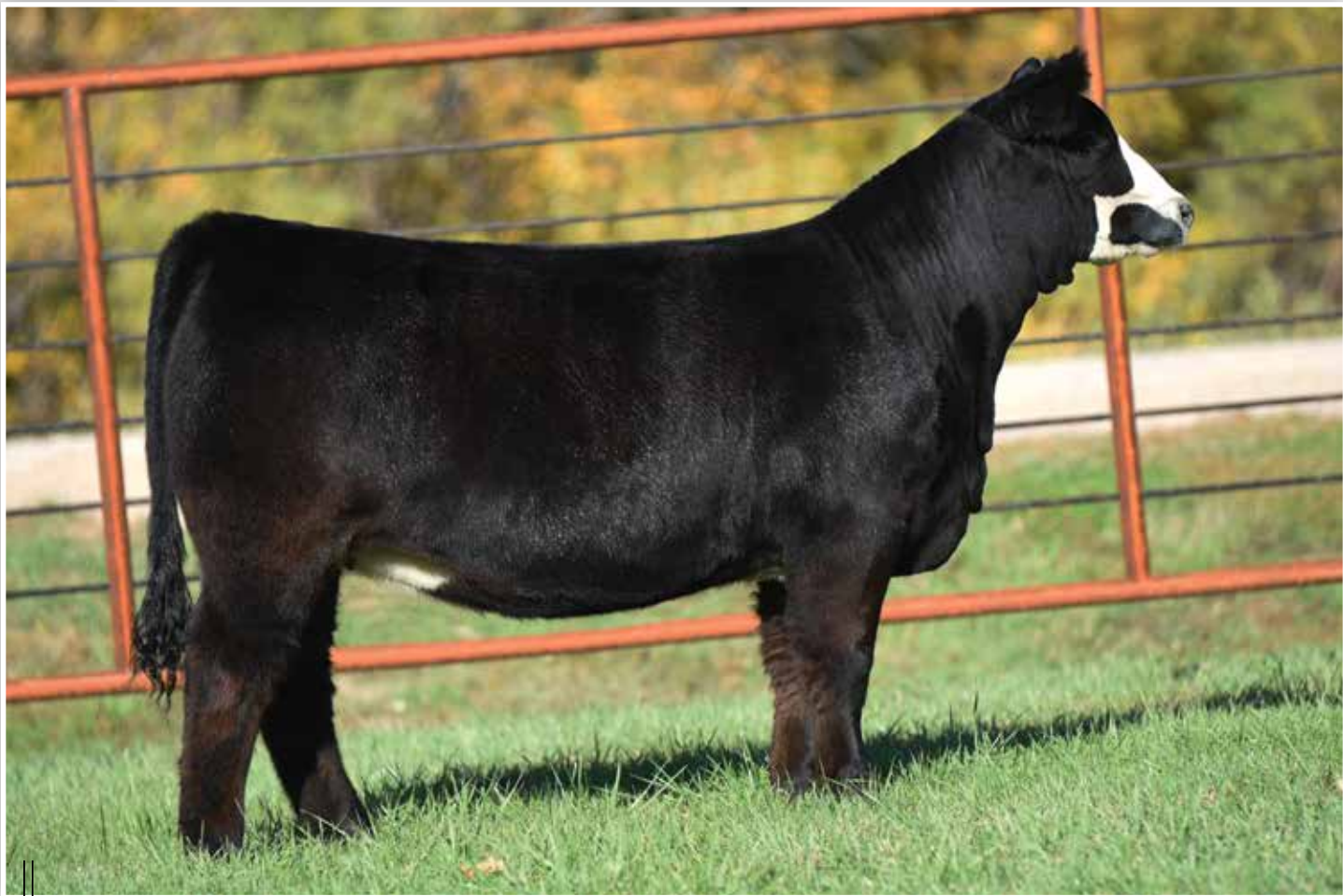
LOT B1 - BFJV CURIOUS TECUMSEH L47