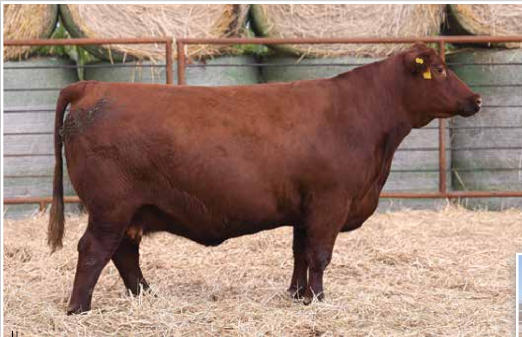
LOT 141 - LSF SRR LARKABA C5374 F8381

F8381 is a Category 1A female that is a very productive built daughter of Brown JYJ Commitment C5733 that is backed by a female bred in the famed Ludvigson Stock Farms breeding program. This dark cherry red female offers a truly unique number profile. She ranks top 16% ProS, top 12% GM, top 8% WW, top 8% YW, top 10% ADG, and top 13% Marb. Safe in calf to the $250,000 TL Ledger with a half-blood calf on the way!