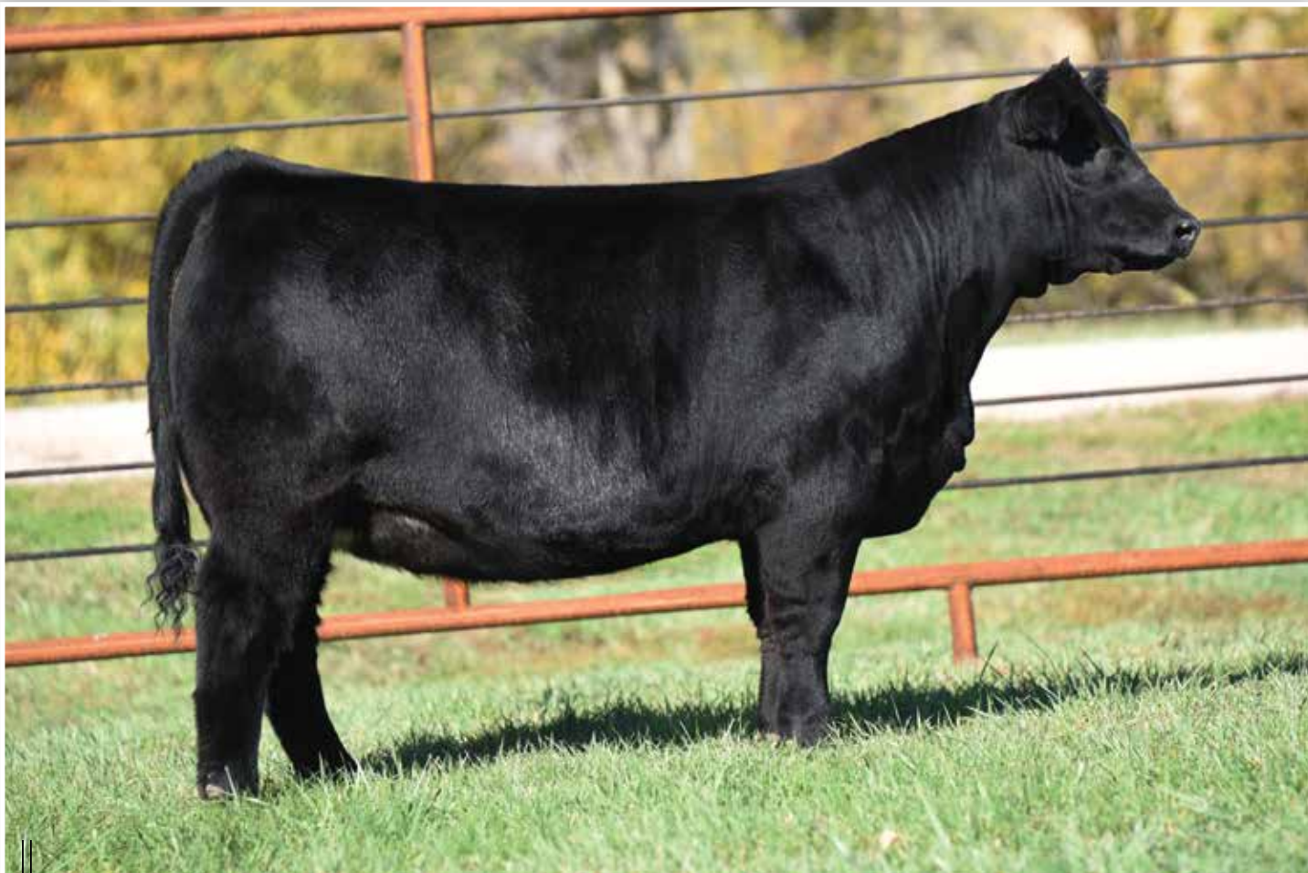
LOT B3 - BFJV FOREVER SAM L133