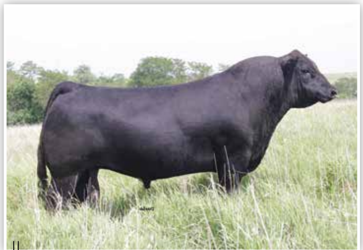
WAGR DRIVER 706T - LEGENDARY SIRE OF LOT 96

AI Sire: STCC TECUMSEH 058J (ASA: 3958195) | AI Date: 4/27/23 | Due: 2/3/24