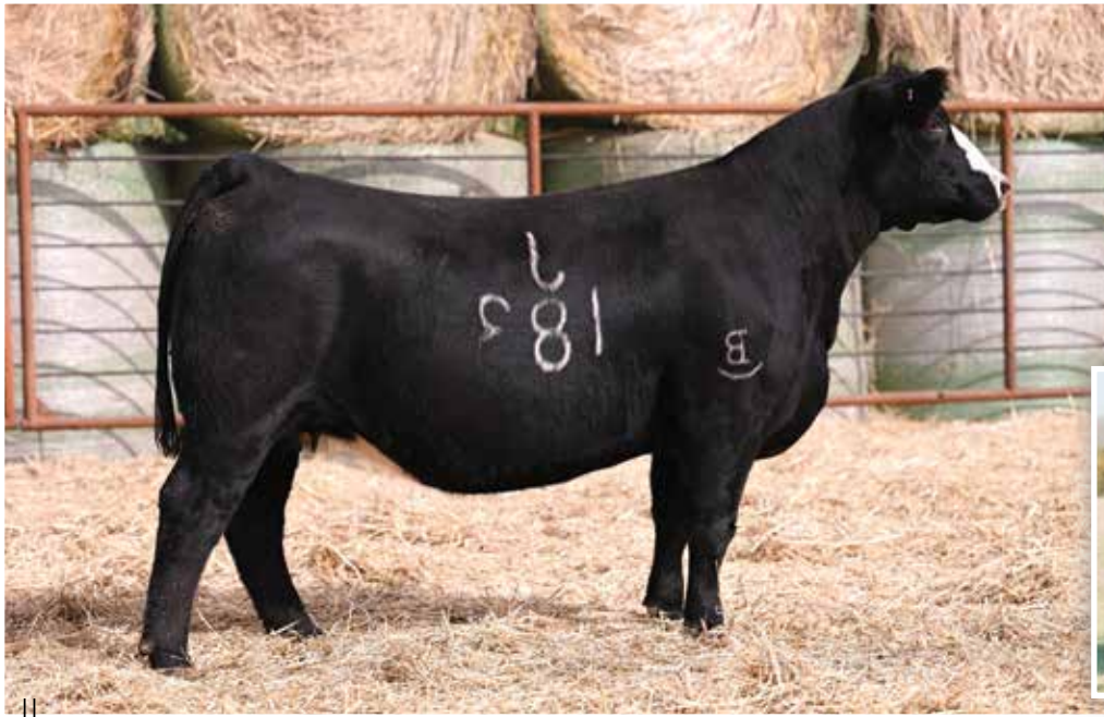
LOT 147 - BFJV MS WHISKEY J183

J183 is a direct daughter of the iconic Irish Whiskey, one of the most influential individuals in the history of the Maine-Anjou breed! Her striking blaze face only further enhances the eye appeal and presence that she offers from the side. Her captivating look and skeletal quality combines make her a truly elite breeding piece. She is safe in calf to the $250,000 TL Ledger!