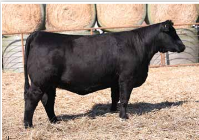
LOT 63 - BFJV MS THOR K275

K288 is a stunning full faced baldy by the calving ease specialist, Thor 503C. This female is loaded with maternal excellence, offering an abundance of body mass and capacity. Thor 503C is a direct son of BF Miss Crysteel Tango, one of the highest dollar generating females in the Simmental breed. Here is a prime example of the quality that you can expect in volume from Bruhn Cattle Company!