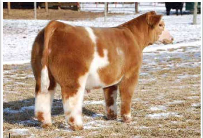
DAKOTA GOLD - SIRE OF LOT 159

AI Sire: TL LEDGER (ASA: 3240219) | AI Date: 7/3/23 | Due: 4/10/24