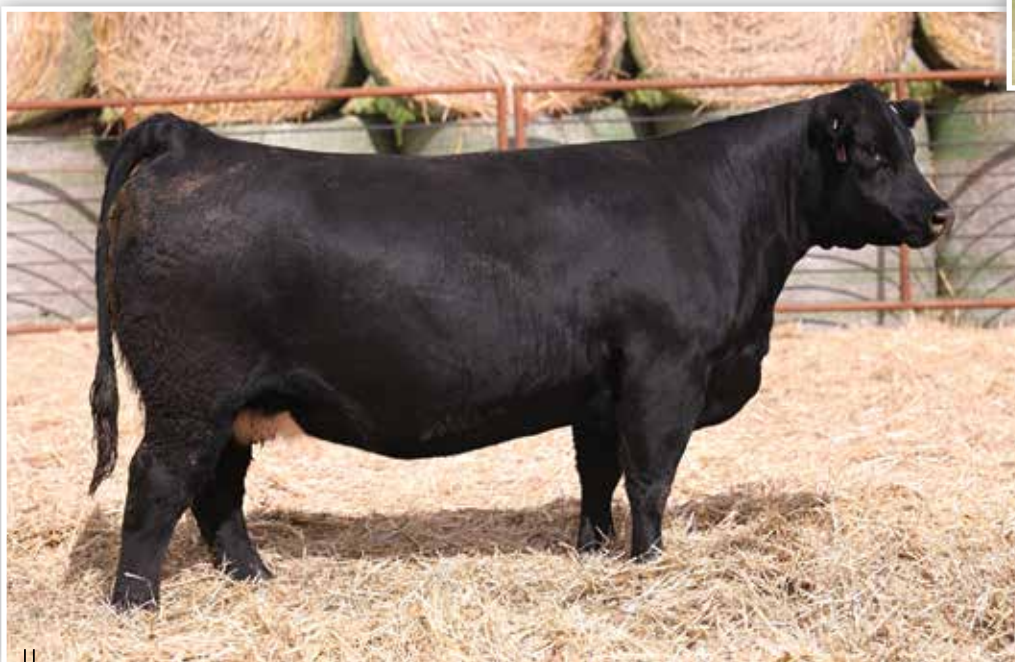
LOT 134 - BFJV MS MARGIN G92

A super deep sided, yet skinny necked quarter-blood who reads all day for big time cow power, this one is fun to look out, she's nonconventional in the way she ties together her pieces. We think In God We Trust is the most valuable and consistent Club Calf bull to perhaps ever be promoted, and this mating on G92 could return your initial investment and more very quickly.