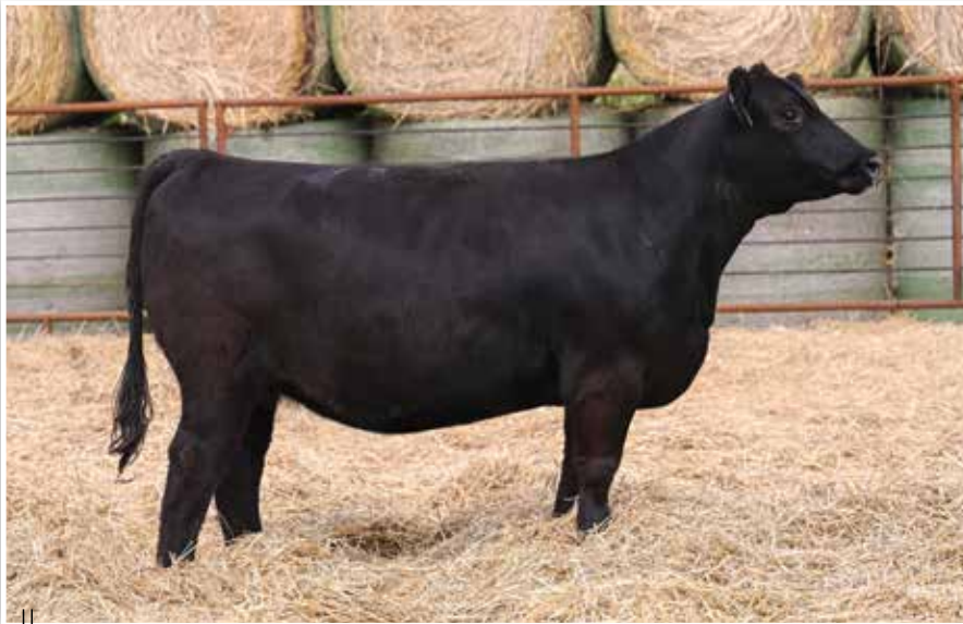
LOT 97 - FRKG COUNTESS 15J