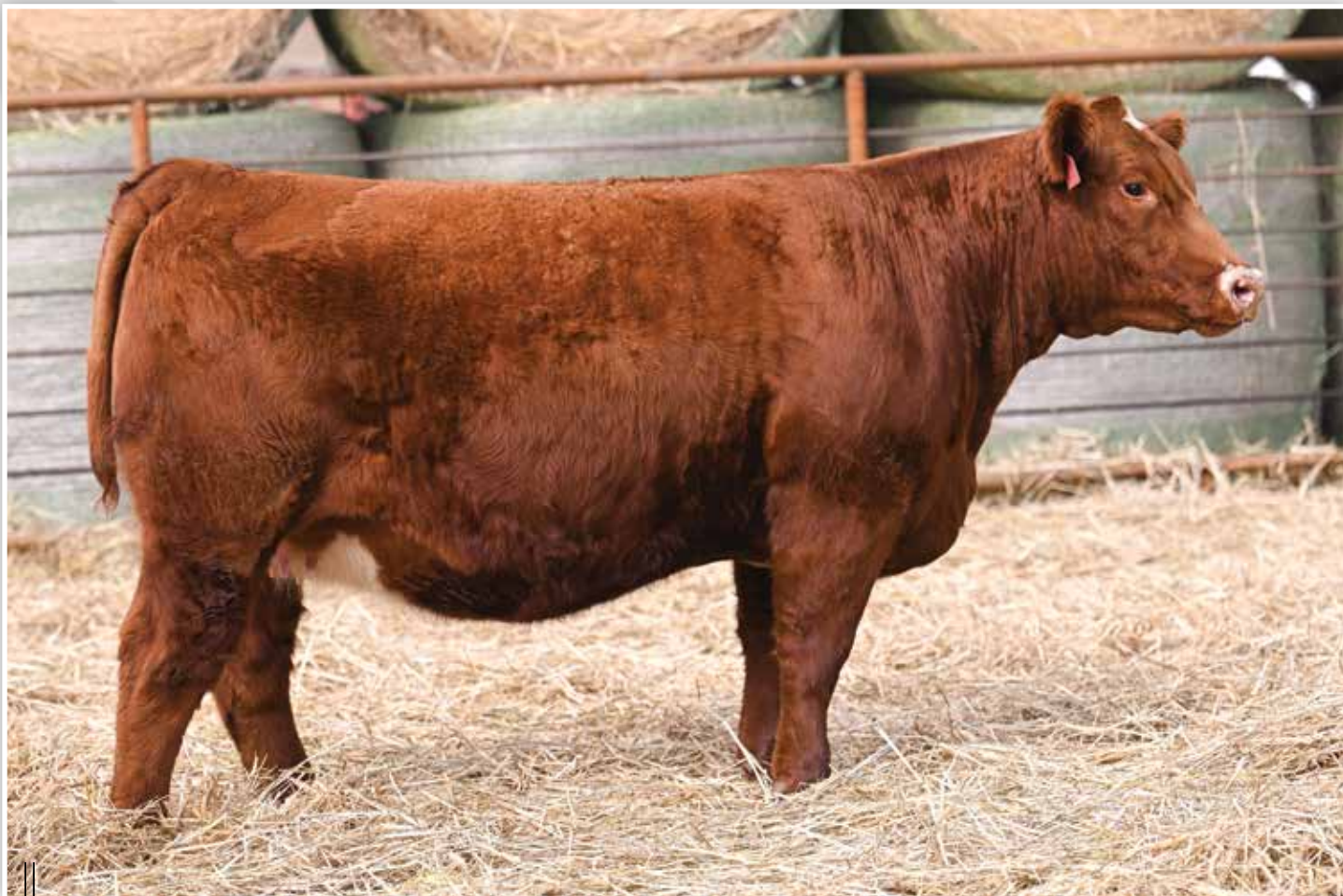
LOT 73 - BUE/GSR O'LOVE ME