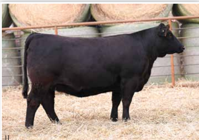
LOT 54 - BFJV MS HARD RIGHT K287

One of the longest fronted, most extended daughters of the $60,000 OMF Hard Right H21 in this year's sale offering. A beautiful profiling female with tremendous rib capacity and a perfect hip and hind leg.