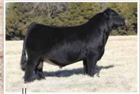
GEFF COUNTY O SIRE OF LOT 44

K280 is sired by the impressive GEFF County O, one of the top W/C Loaded Up 1119Y sons to ever surface! A moderate framed, easy keeping female that sells safe to FRKG Classic 948K with a confirmed heifer calf on the way!