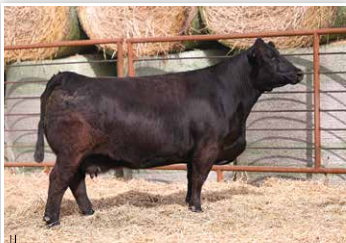
SS BIANCA - DAM OF LOT 34 - SHE SELLS AS LOT 127