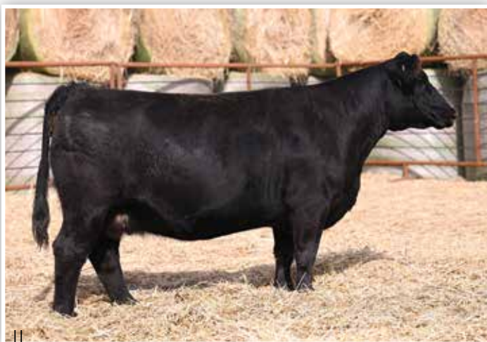
LOT 92 - BFJV MS LEDGER G93