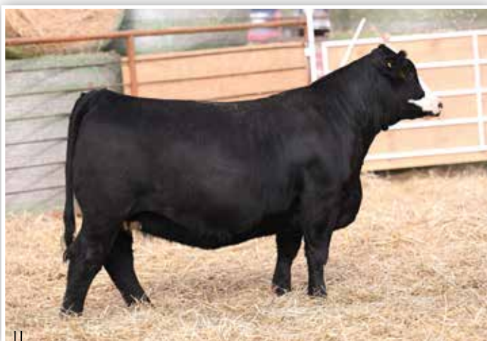
LOT 42 - BFJV MS CYCLONE K212

Here is a striking blaze faced daughter of W/C Cyclone 385H that is supported by a half-blood daughter of the triple crown winning MR HOC Broker. She is big footed, stout boned, and offers a high quality presence from the side.