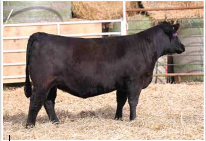
LOT 59 - BFJV HIGH STYLE J187

J187 is a well-balanced daughter of the $100,000 Conley High Rise F3 that is supported by the influence of the legendary Silveiras Style 9303. The dam of J187 was bred in the Plum Creek breeding program and traces to the everlasting impact of LaGrand Famous 4754. Her dam has been one of the premier donors in the Bruhn program when it comes to generating elite half-blood SimGenetic cattle. Safe to the newest member of the herd sire battery, FRKG Classic 948K!