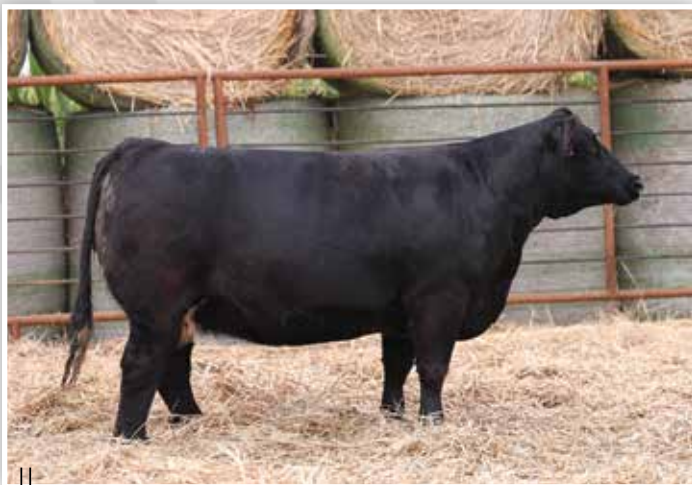
LOT 91 - BFJV SPLASH OF LEDGER G977

A well designed, big footed, stout featured daughter of TL Ledger that is long sided, big hiped and square built at the surface. A very high quality young female that sells safe in calf to FRKG Classic 948K.