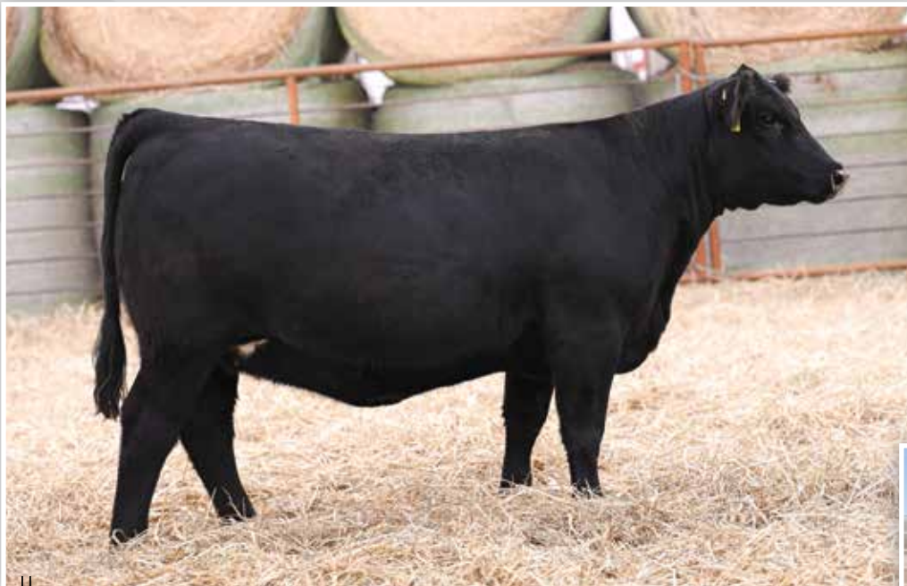
LOT 66 - BFJV MS LEDGER K224

Here is a neat featured, smooth shouldered daughter of TL Ledger that is sound footed, big ribbed, and offers a low maintenance look of quality and productivity. Safe to Conley High Rise F3 sexed female semen for a fast ROI.