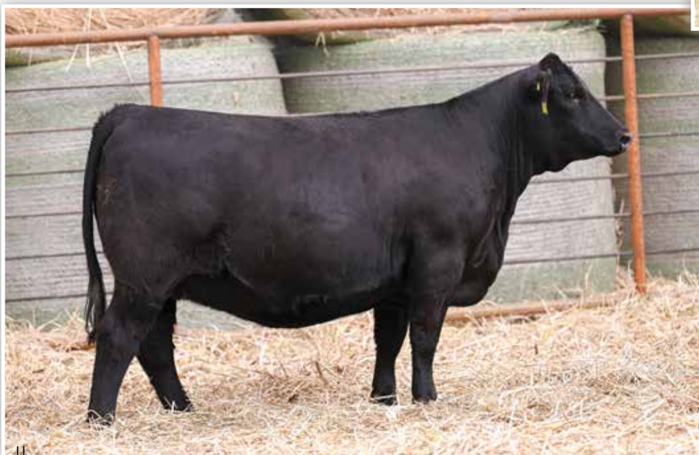
LOT 52 - BFJV MS HARD RIGHT K258

It's no secret that the OMF Hard Right H21 sire group offers a later maturing look of quality when they first hit the ground. As these females continue to develop, they surface to the forefront of their contemporary group. They are cattle with genuine base width, stoutness of bone, and unparalleled rib shape and capacity. Another female that sells safe to sexed female FRKG Classic 948K semen!