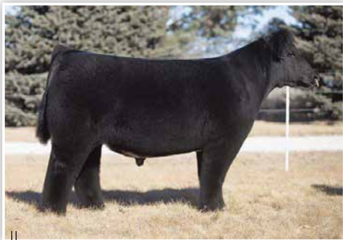
COWANS SAFE & SOUND 116A - SIRE OF LOT 145

Quality red hided cattle continue to surge, and females like D70 are the reason why! There is no denying the genuine shape, body mass, and overall dimension that this dark cherry red hided Maintainer female brings to the equation. We love the extra stoutness, heaviness of structure, and skeletal quality that this female offers. Cowan Safe & Sound 116A is proving his worth now that daughters are in production. A true sale feature that is safe in calf to the $210,000 FRKG Classic 948K with a heifer baby on the way. Bid to own – females like this are the kind that make land payments!