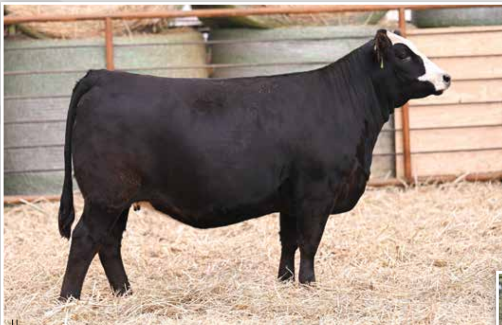
LOT 57 - BFJV MS HIGH RISE K266

Conley High Rise F3 has secured his place as one of the premier sires in the breed. He is supported by a tremendous dam, Conley Sheza Star D3, the $120,000 high selling Simmental female in the Conley Cattle Fall Production Sale that was selected by Lindskov's LT Ranch and Aces Wild Ranch. This three-quarter blood blaze faced female offers a stunning look of quality and style from the side. A must see set of females sired by a maternal legend within the Simmental breed.