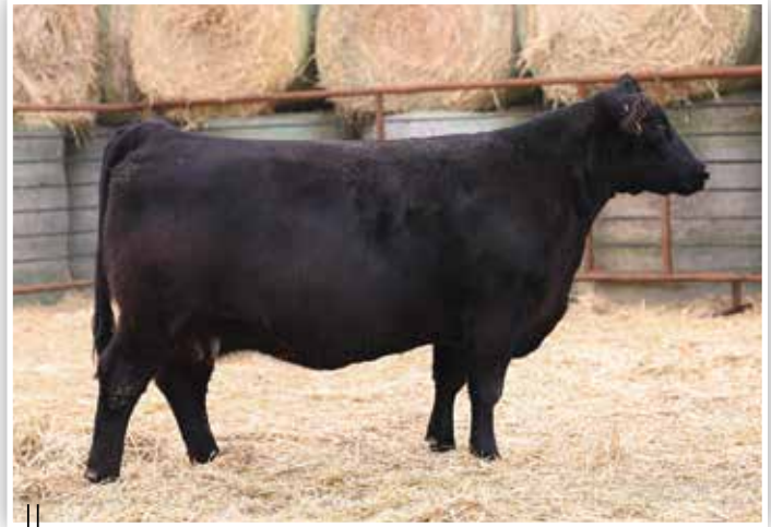
LOT 211 - BFJV MS 417