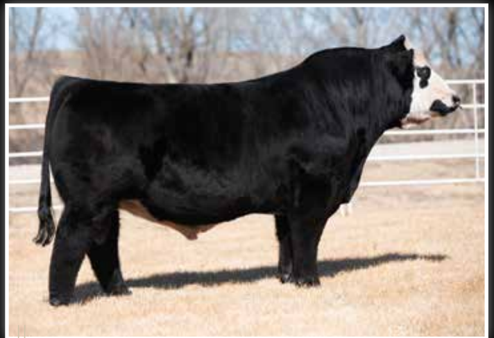
SFI SAVAGE D20 - SIRE OF LOTS 114-126