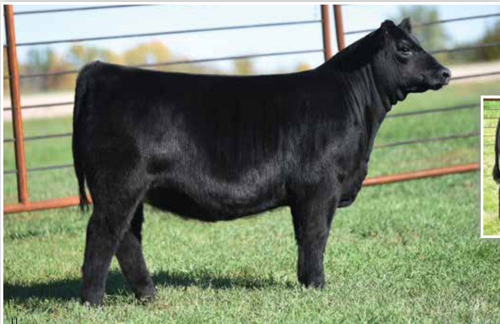
LOT B5 - BFJV GOOD LADY L128

Here is a pair of ET flushmate sisters that are also full sisters to the lot A5 herd sire prospect, BFJV Good Times L346. They are sired by the popular and highly proven STAG Good Times 201 ET and supported by the everlasting influence of the legendary Lazy H Bar Forever Lady 5001 cow family! The dam of this pair of females is sired by S A V Brave 8320 and is a direct daughter of the prolific 5001 donor. The genetic relevance that this pair of sisters brings to the table is simply unparalleled. Their pedigree aligns the influence of FCF Proven Queen 419, SCC Phyllis 052, and Lazy H Bar Forever Lady 5001... what more could you ask for?!