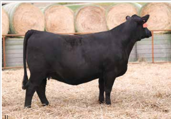
LOT 7 - BFJV MS REMEDY K210