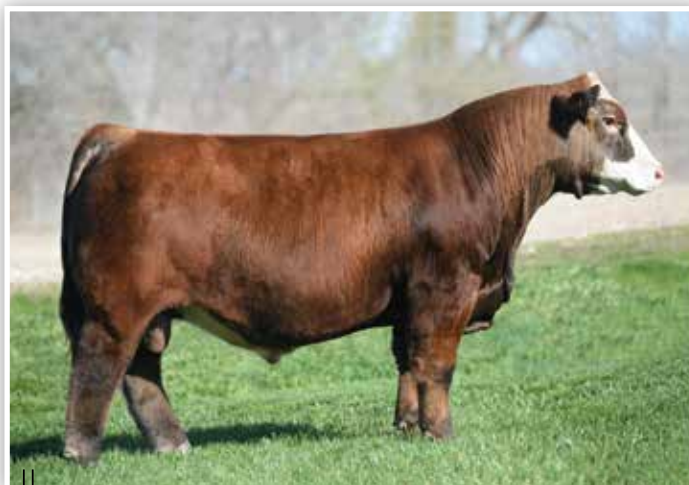
W/C CYCLONE 385H - SIRE OF LOTS 34-43

K042 is sired by W/C Cyclone 385H, the W/C Bankroll 811D son that is backed by the influence of W/C Miss Angel 2870Z. Her dam, SS Bianca, is the OCC Ultra Wide 862U sired female that traces to the legendary KenCo Miley Cottontail! Her lineage is saturated with maternal excellence from top to bottom. K042 is a well-balanced, sleek fronted female that is robust in her mid-rib with a textbook set to her hip and hind leg. A sale feature that sells safe in calf to the $250,000 TL Ledger!