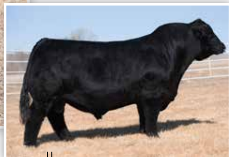
TL LEDGER - $250,000 MATERNAL GRANDSIRE OF LOT 20

A long bodied, smooth made, sound footed daughter of SO Remedy 7F that is safe in calf to the red baldy calving ease specialist, W/C Cyclone 385H.