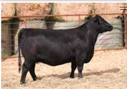
LOT 223 BFJVF MS 023

AI Sire: TL LEDGER (ASA: 3240219) | AI Date: 7/12/23 | Due: 4/19/24