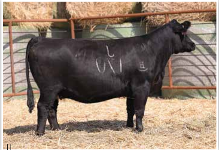
|| LOT 131 - BFJV MS LOGIC J170

JBSF Logic 5E never saw the mass use his quality probably deserved! The handful we have had around have all been awesome cattle, this one is square built, has stop you in your track eye appeal, a robust rib cage and huge set of feet and legs. Make sure you mark this one for inspection when you come to Dunlap.