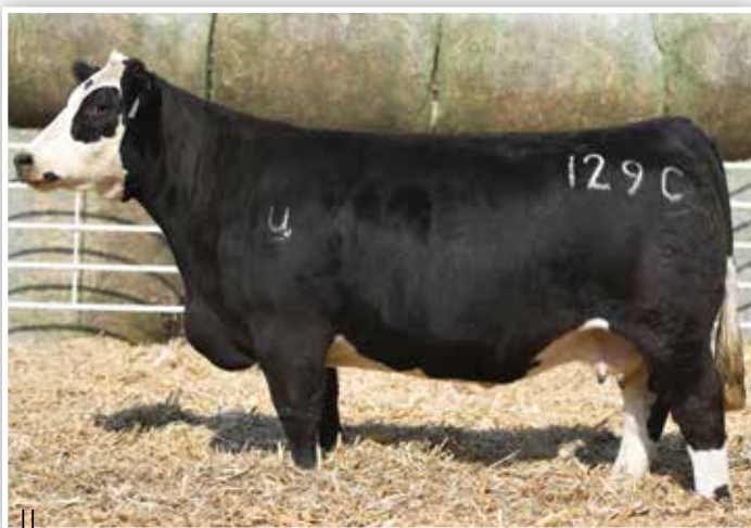
UDE 129C - DAM OF LOT 91