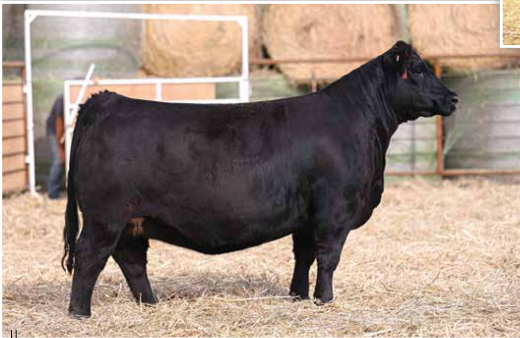
LOT 29 - BFJV MS LOADED UP K210

K210 is the solid black daughter of W/C Loaded Up 1119Y. She is unparalleled in terms of her ability to combine mass with such a feminine and refined look about her front third. She is chiseled about her head and neck, neat chested, and transitions into a massive forerib and center body shape. She is safe in calf to the $530,000 SO Remedy 7F for a HUGE return on investment!