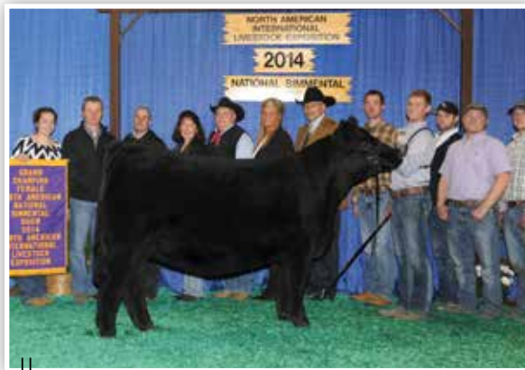
HILB CRAZY N LOVE A475S - 2014 NAILE GRAND CHAMPION SIMMENTAL HEIFER MATERNAL GRANDDAM OF LOT 73