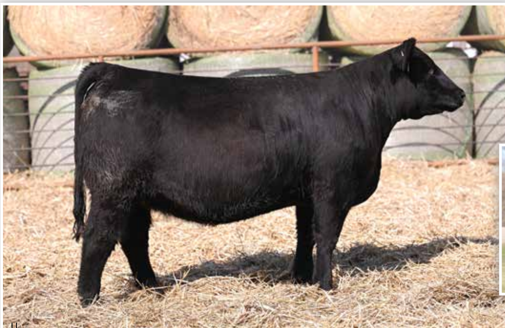
LOT 32 - BFJV MS PINNACLE K208

Another daughter of W/C Pinnacle E80 that will catch your attention on sale day! Check out the body mass and capacity that she offers. A true brood cow in the making!