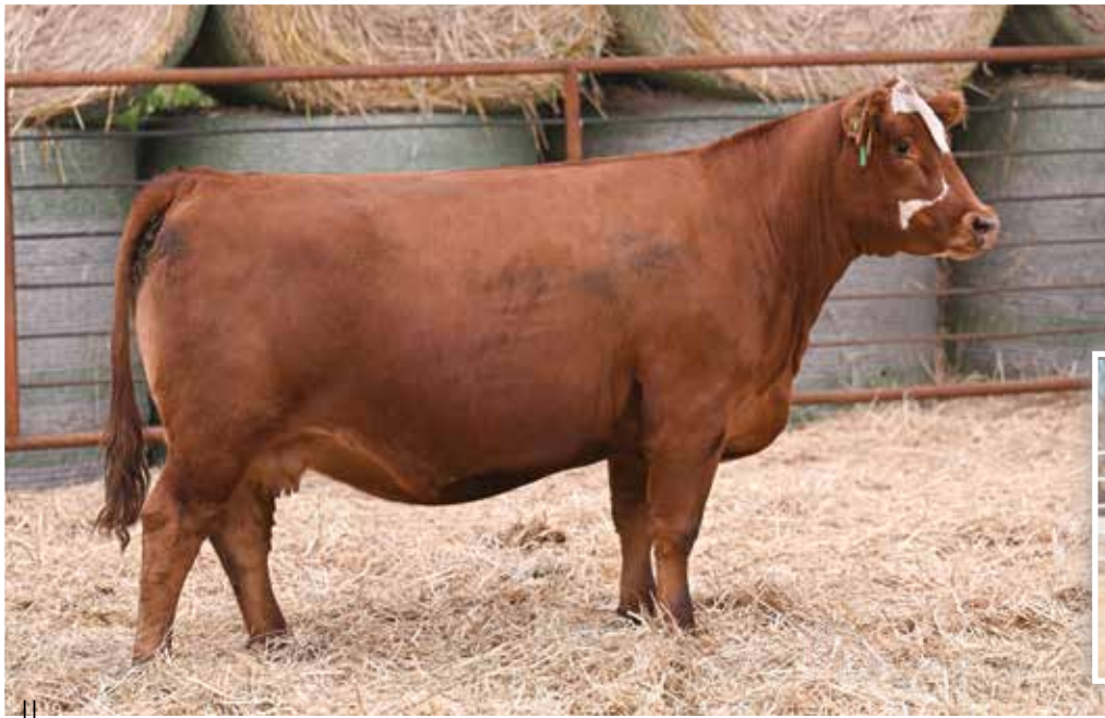
LOT 82 - BFJV MS SAVAGE H12