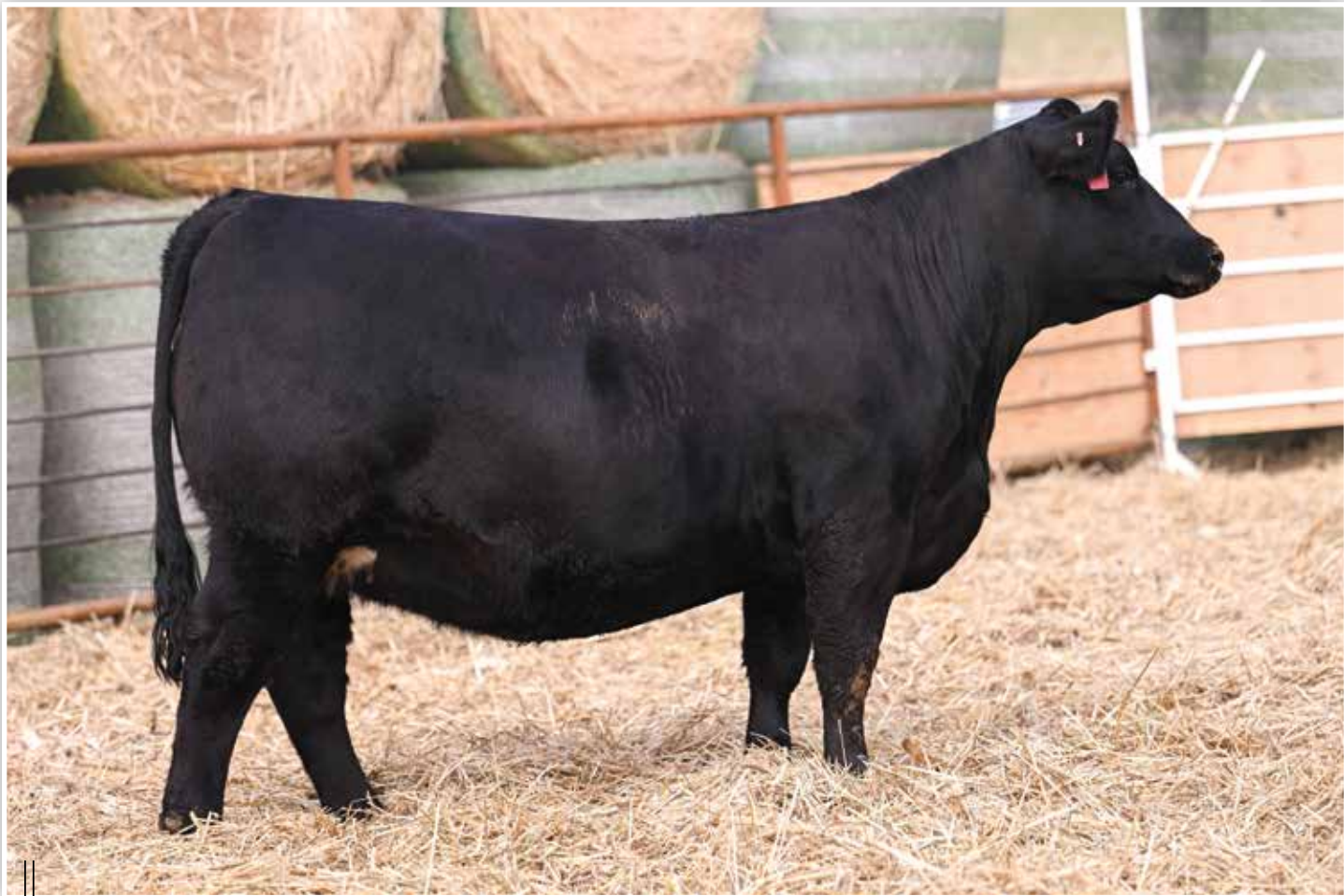
LOT 48 - BFJV RUTH'S HARD RIGHT K245