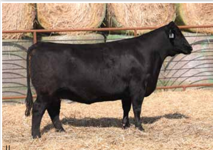
LOT 185 - BFJV MS 933

AI Sire: SFI SAVAGE D20 (ASA: 3139297) | AI Date: 5/27/23 | Due: 3/4/24