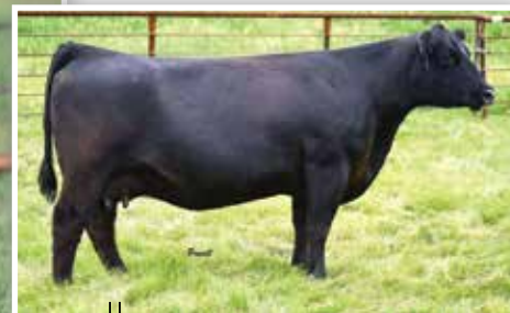
LAZY H BAR FOREVER LADY 317 - MATERNAL SISTER TO DAM OF LOTS B3-B5