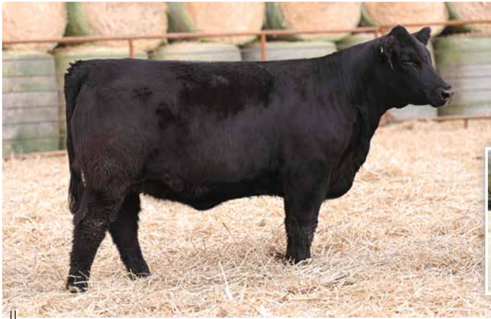
LOT 44 - BFJV COUNTY O K280

K280 is sired by the impressive GEFF County O, one of the top W/C Loaded Up 1119Y sons to ever surface! A moderate framed, easy keeping female that sells safe to FRKG Classic 948K with a confirmed heifer calf on the way!