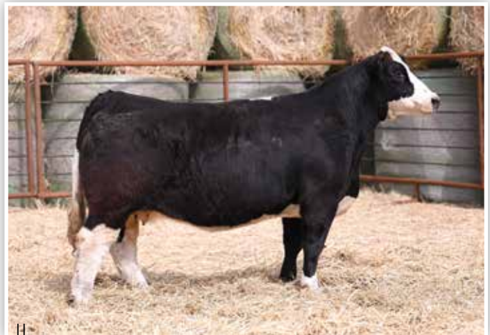
LOT 95 - BFJV MS BROKER H082

Check out this half-blood daughter of MR HOC Broker that offers tremendous stoutness and shape! This chromed up female not only has the color to be noticed on sale day, but the undeniable quality and power. The In God We Trust x MR HOC Broker genetic combination has yielded countless high sellers and champions across the country! Show cattle enthusiasts gather round!