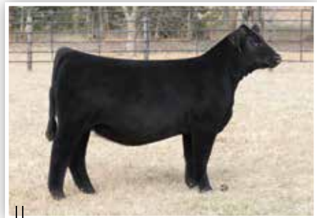
FRKG COUNTESS OF 948 11K $65,000 MATERNAL SISTER TO LOT 97