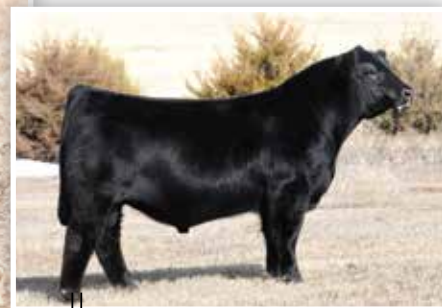
W/C RELENTLESS 32C SIRE OF LOT 46