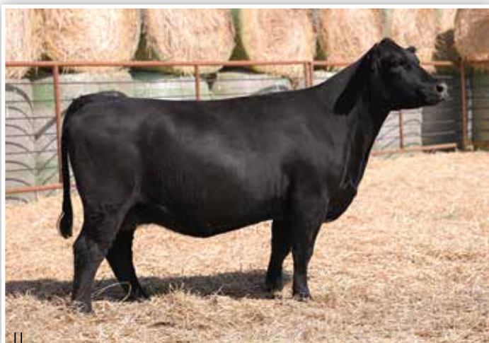
LOT 129 - BFJV MS THOR 912G

A red hided, purebred female that combines both the two most renowned breeding bulls to come out of the historic Remington program in Remington Secret Weapon 185 and Remington Lock N Load 54U. She sports a genomic package geared for calving ease and impressive yield grade.