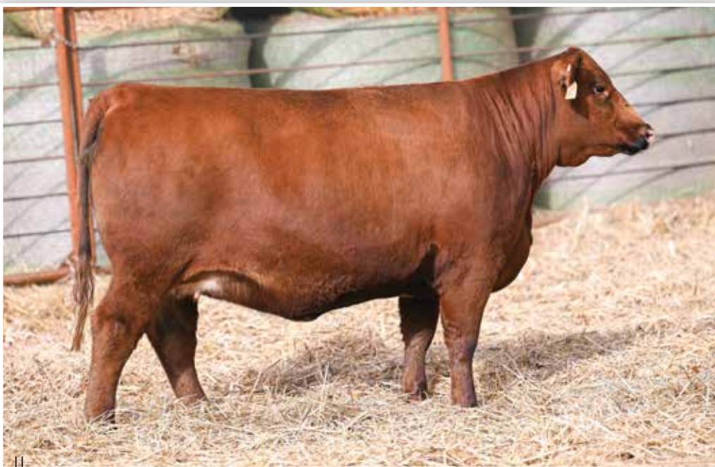
LOT 144 - BFJV MS K6099

Here is another very productive, low input red hided female that offers tremendous depth of body and spring of rib. She is an easy keeping female that is certain to be a profitable brood cow in production with tremendous longevity.