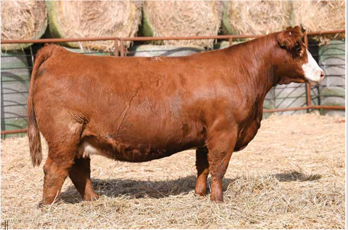
LOT 79 - SWSN MS KENTUCKY PROFIT 4H