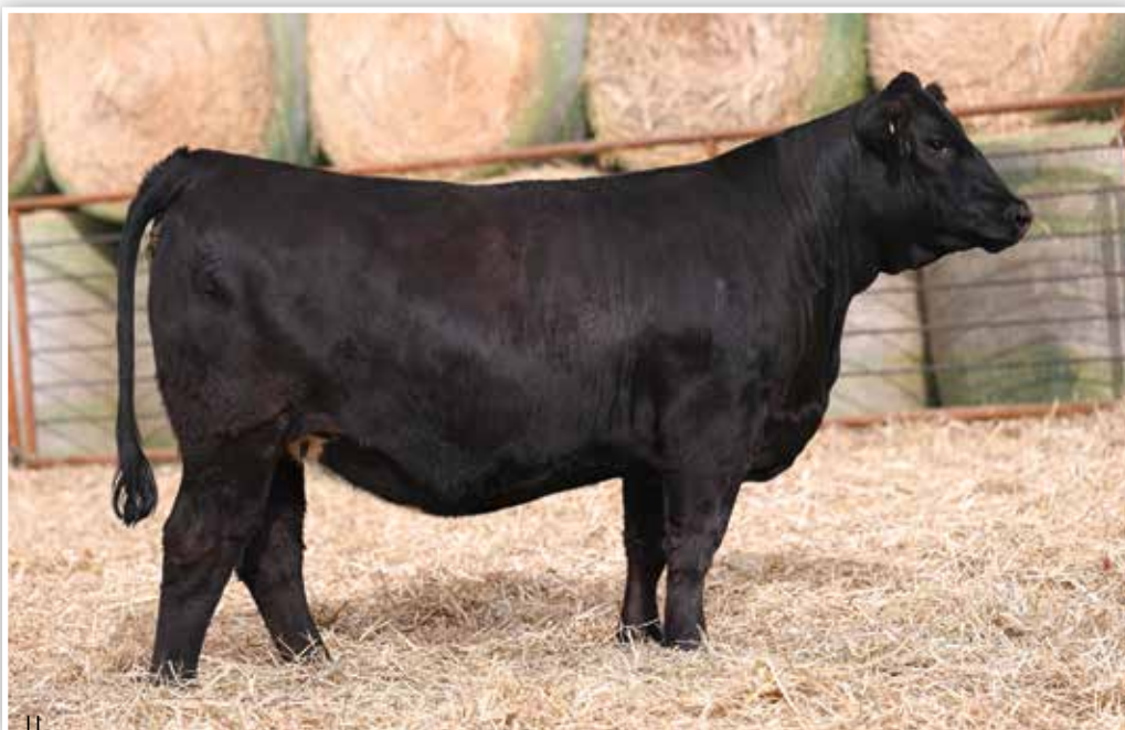
LOT 20 - BFJV HARLEY QUIN

Here is a stout featured three-quarter blood female sired by the great SO Remedy 7F. Her dam is a stunning half-blood sired by the $250,000 TL Ledger. She is safe to the impressive red baldy, W/C Cyclone 385H.