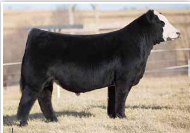
JASS ON THE MARK 69D MATERNAL GRANDSIRE OF LOT A1 & A2

Next up is a herd sire prospect that is hard to deny! This striking blaze faced stud is all bull to say the very least! Massive in the shape of his rib cage, soft bodied, huge hiped, and loaded with power from end to end. We love the extra substance and mass that this bull offers. He is another direct son of our BS Curiosity 10G donor dam, a female that continues to knock it out of the park regardless of our sire selection. BFJVF SAM L344 is so three-dimensional in his shape, wide based, and genuine from end to end. A big scrotal bull that is rugged in his design, offering the credentials of a herd bull prospect that are simply unrivaled. A must see on sale day!