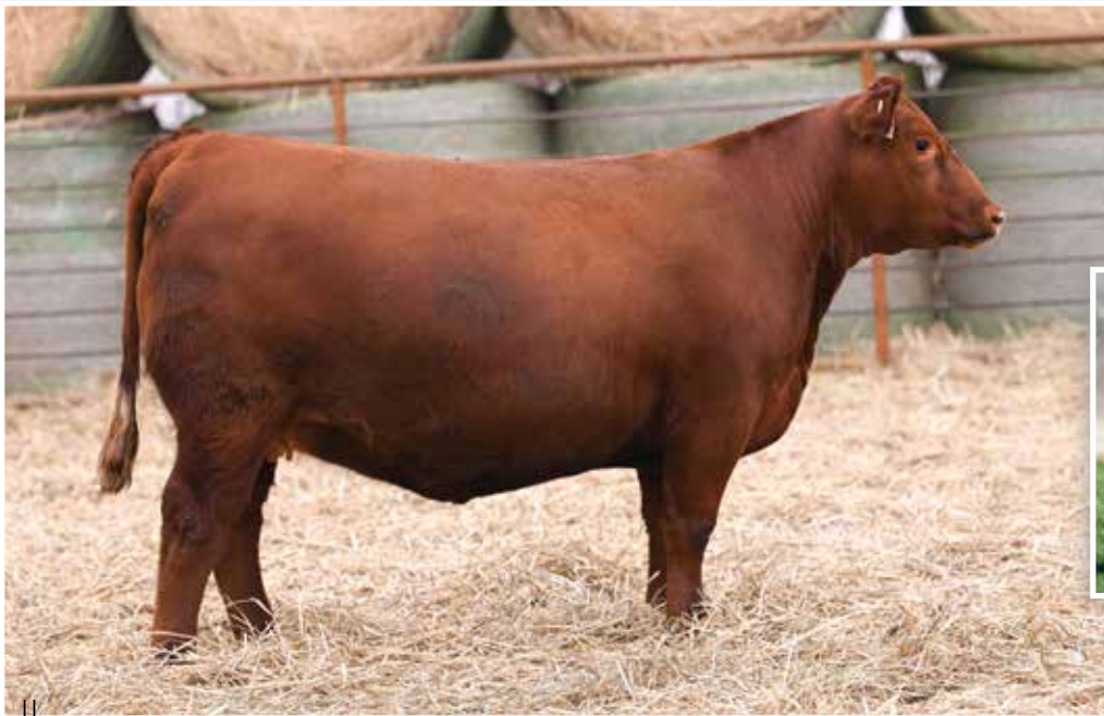
LOT 143 - BFJV MS 9004

This huge bodied, easy fleshing, sound structured Red Angus female offers a look of maternal functionality without sacrificing quality. She sells safe to the red baldy stud, W/C Cyclone 385H!