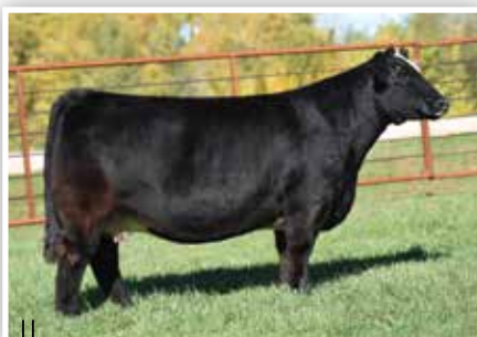
BS CURIOSITY 10G DAM OF LOT B1