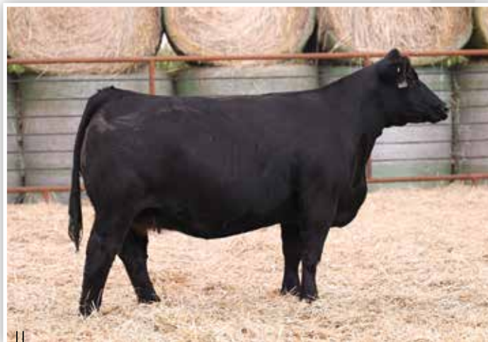
LOT 115 - BFJV MS SAVAGE H237

A sow bodied, easy fleshing daughter of SFI Savage D20 that combines style and femineity with plenty of muscle and shape about her rear third. She is coming with a TL Ledger heifer calf, that is going to be one that stands out come weaning time, I already know that we will be wishing we still owned her!