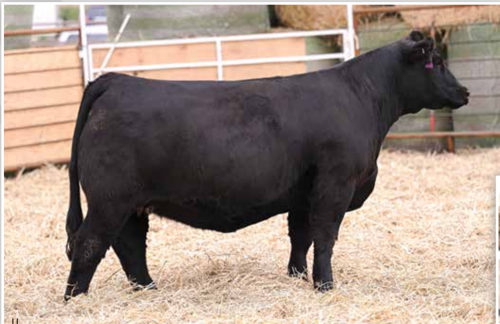
LOT 46 - BFJV MS RELENTLESS J186