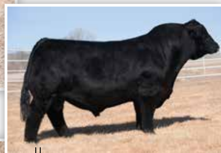
TL LEDGER $250,000 SERVICE SIRE TO LOTS 141 & 142

F8381 is a Category 1A female that is a very productive built daughter of Brown JYJ Commitment C5733 that is backed by a female bred in the famed Ludvigson Stock Farms breeding program. This dark cherry red female offers a truly unique number profile. She ranks top 16% ProS, top 12% GM, top 8% WW, top 8% YW, top 10% ADG, and top 13% Marb. Safe in calf to the $250,000 TL Ledger with a half-blood calf on the way!