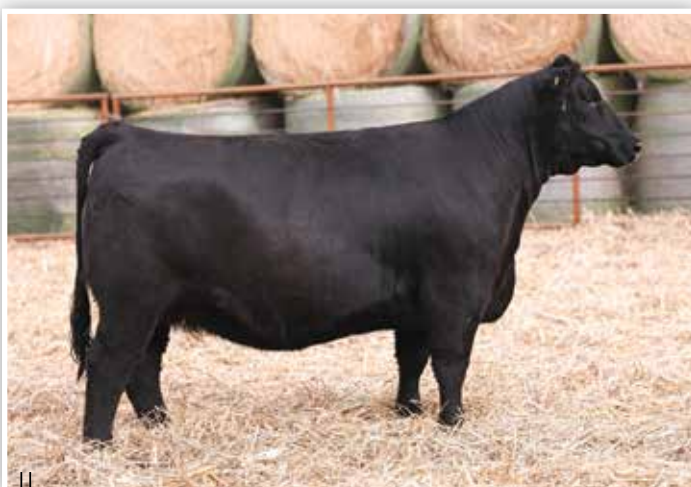
LOT 37 - BFJV MS CYCLONE K202

K226 is one of the elite females that will sell on November 18, 2023 in Dunlap, Iowa! She is so refined about her front third, clean chested, and smooth shouldered, all the while offering an abundance of mass and power from that point back. A very unique female that deserves serious consideration.