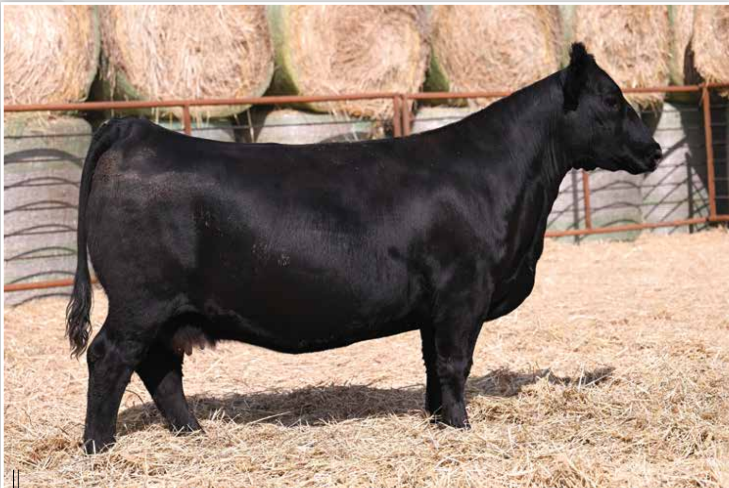
LOT 84 - BFJV JANE'S PROFIT H066