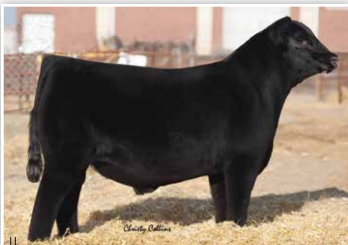
SILVEIRAS STYLE 9303 - SIRE OF LOTS 136 & 137

Here is an Angus heifer sired by Silveiras Style 9303 that is massive bodied, big hiped and long fronted. Her dam is a member of the famed Lazy H Bar Forever Lady 5001 cow family, one of the highest dollar generating Angus females in the history of the Lazy H Bar breeding program. Her maternal grandsire is the two-time NWSS Reserve Grand Champion Angus Bull, BSF Opportunist Z5, a true outlier for bone, substance, and shape!