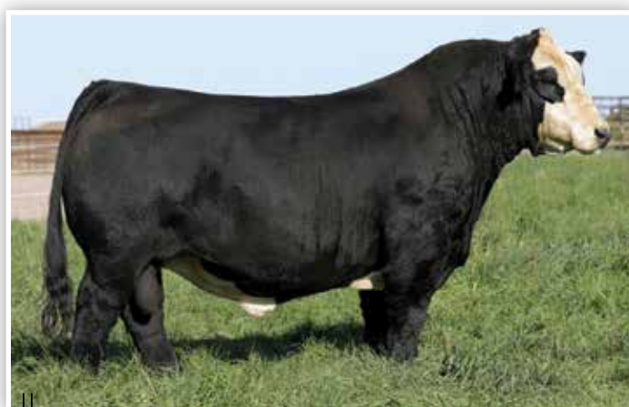
|| W/C BANKROLL 811D - $205,000 SIRE OF LOTS 99-103

A stout ended, massive hipped and heavy muscled daughter of the record setting, W/C Bankroll 811D. A sire that has proven to automatically click with Angus bred females, adding the extra features, look and chrome you will find here! We love how sharp featured and intriguing this one reads from the side, while still being powerful.