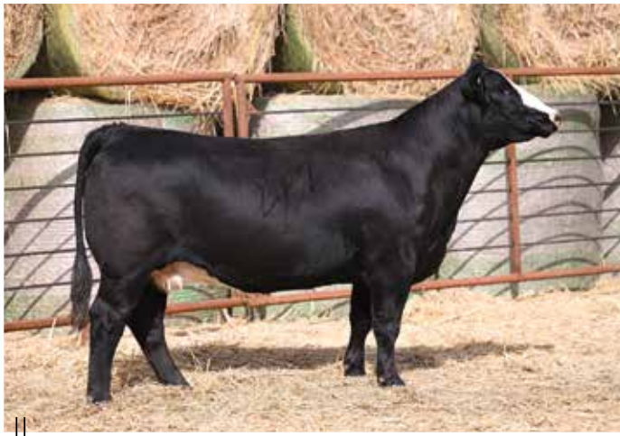
LOT 210 - BFJV MS 834