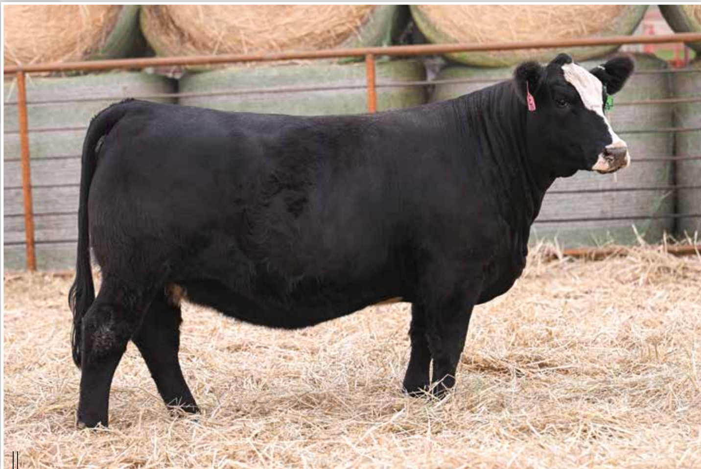
LOT 33 - BUE MS SHE SO FINE