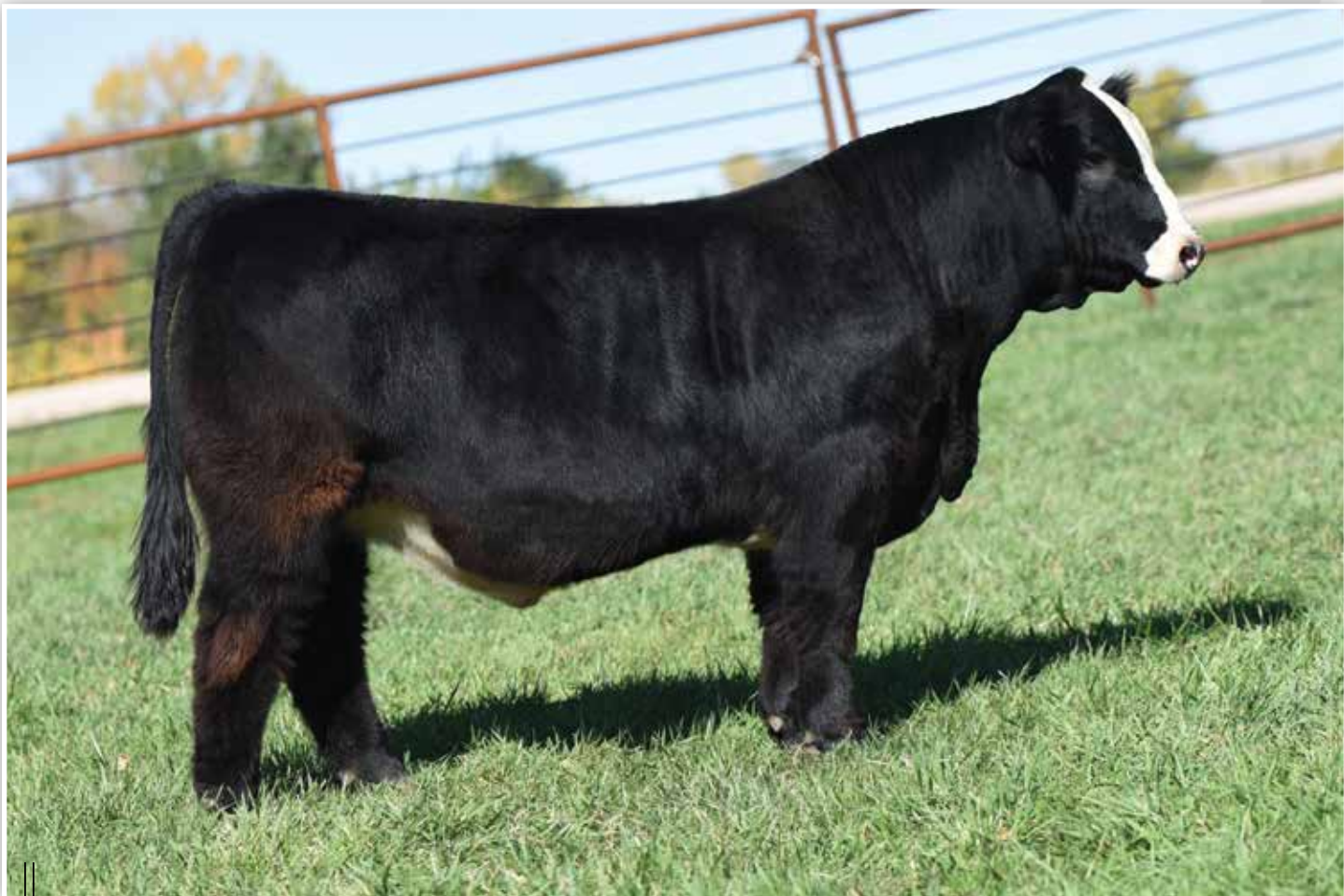
LOT A2 - BFJV SAM L344