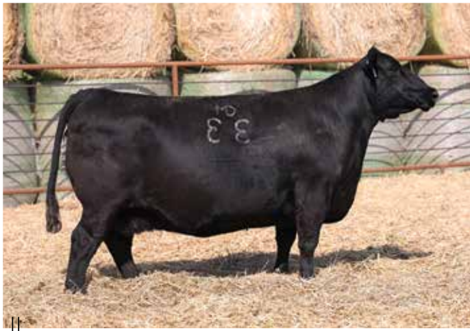
LOT 189 - BFJV MS 33