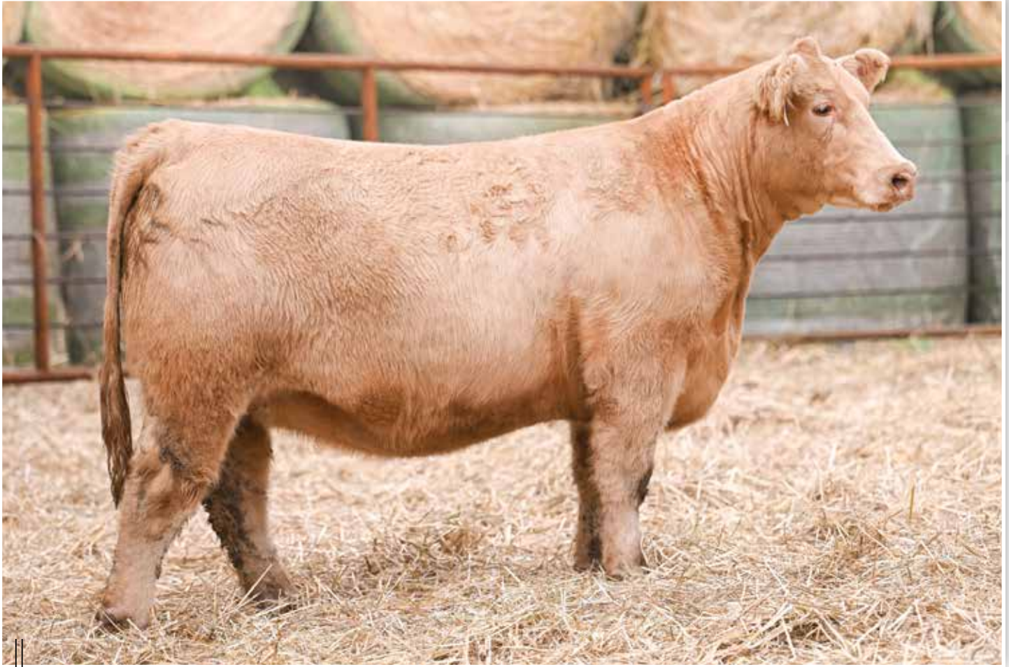
LOT 158 - BFJV MS HOLY SMOKER K276

The club calf industry is shaped around this type of a female, actually its lead by this type of cow. We absolutely love the outline and presence that this one hits you with, we aren't sure how you would draw a better picture than what this Holy Smoker daughter poses with. We think she is the kind to generate both haired and slicking steers and could even be used for making composite show heifers if you choose!