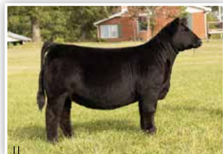
$21,000 FULL SISTER TO LOT B1