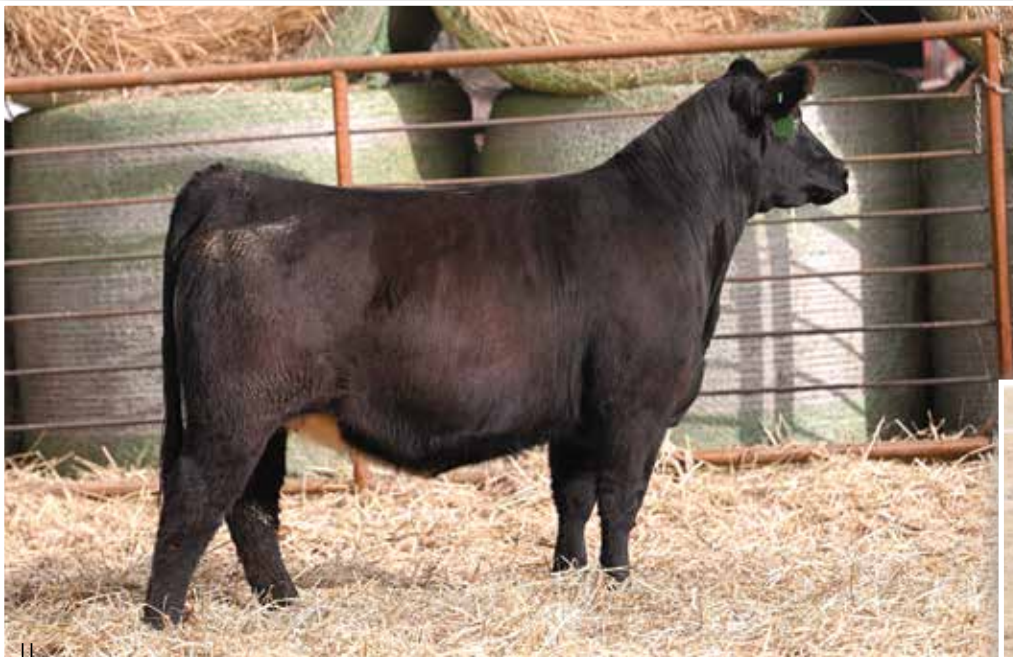
LOT 148 - ROZEBOOM 26

Weis All Me 10F continues to impress with each calf crop that is born. He has emerged as one of the "go-to" sires in the breed to produce elite Maine-Anjou and Maintainer influenced breeding stock. The skeletal quality, presence, and extra shape is what sets his progeny into a league of their own. Countless daughters have been high sellers and champions at the largest and most competitive shows in North America. She sells safe in calf to FRKG Classic 948K sexed female semen!