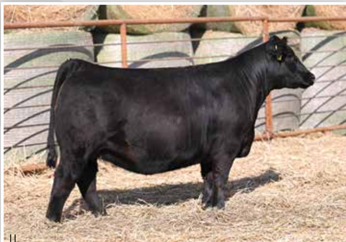
LOT 35 - BFJV MS CYCLONE K216