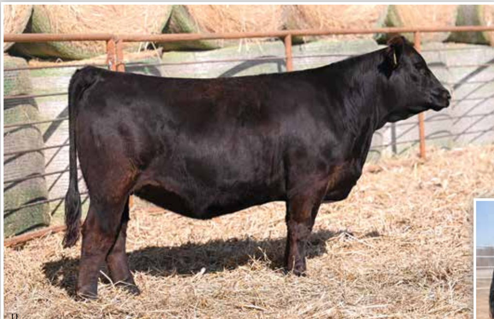
LOT 19 - BFJV MS REMEDY K285

A long bodied, smooth made, sound footed daughter of SO Remedy 7F that is safe in calf to the red baldy calving ease specialist, W/C Cyclone 385H.