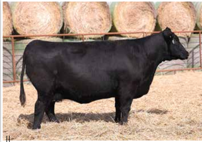
LOT 200 - BFJV MS 44