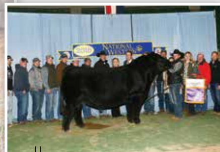
SC PAY THE PRICE C11 TWO-TIME NWSS CHAMPION & MATERNAL GRANDSIRE OF LOT 31

Stout, massive, and square built. J621 is a shapely Purebred Simmental female sired by W/C Pinnacle E80, the full brother to the $205,000 W/C Bankroll 811D. Her dam is sired by the two-time NWSS Grand Champion Purebred Simmental Bull, SC Pay The Price C11.