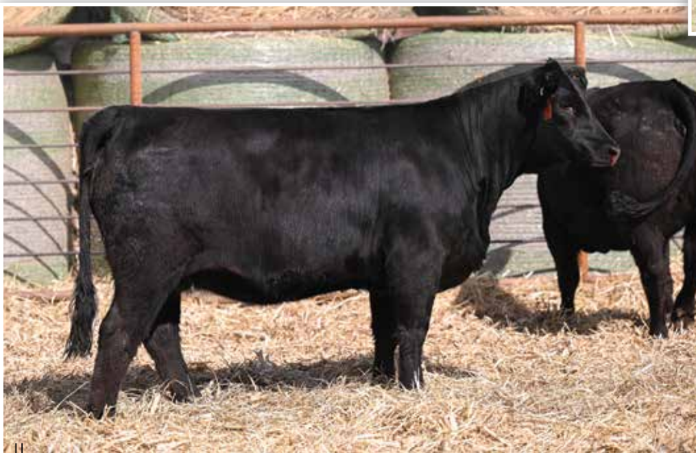
LOT 69 - BFJV MS LEDGER K255

Another daughter of TL Ledger, the $250,000 son of Profit that is a maternal brother to the $300,000 TL Bottomline. A maternal sister to TL Ledger was the $46,000 high selling female in the 2021 Bruhn Cattle Company Dispersal, STN Miss Star Light. She is responsible for producing the $510,000 GPG Cornerstone 1K that was selected by GKB Cattle of Texas. Power in the blood!