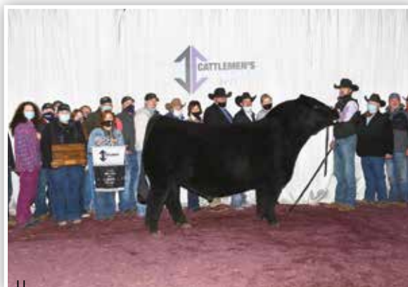
SO REMEDY 7F - 2021 CATTLEMEN'S CONGRESS GRAND CHAMPION PUREBRED SIMMENTAL BULL AND SERVICE SIRE TO LOT 84