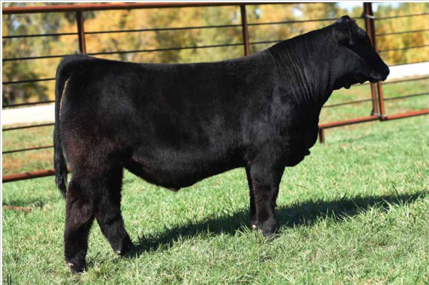
LOT A1 - BFJV VICTORY L334

We initiate a hand selected group of bull calves that undoubtedly have herd sire credentials with a direct son of the $210,000 and now deceased FRKG Victory 78J. There is no question that L334 has the body, dimension, and overall masculinity needed to be a herd sire of significance for any program that makes the investment. This stud is a true beef bull, exemplifying the fundamentals without sacrificing the extra eye appeal and skeletal quality that is demanded by today's industry. The dam of L344 is the impressive BS Curiosity 10G donor dam, a direct daughter of the great JASS On The Mark 69D. A full sister sold at Meyer Genetics for $13,500 and a maternal sister sold for $21,000. Here is your opportunity to get in on the ground floor of one of the very best herd sire prospects to ever surface in Mapleton, Iowa!