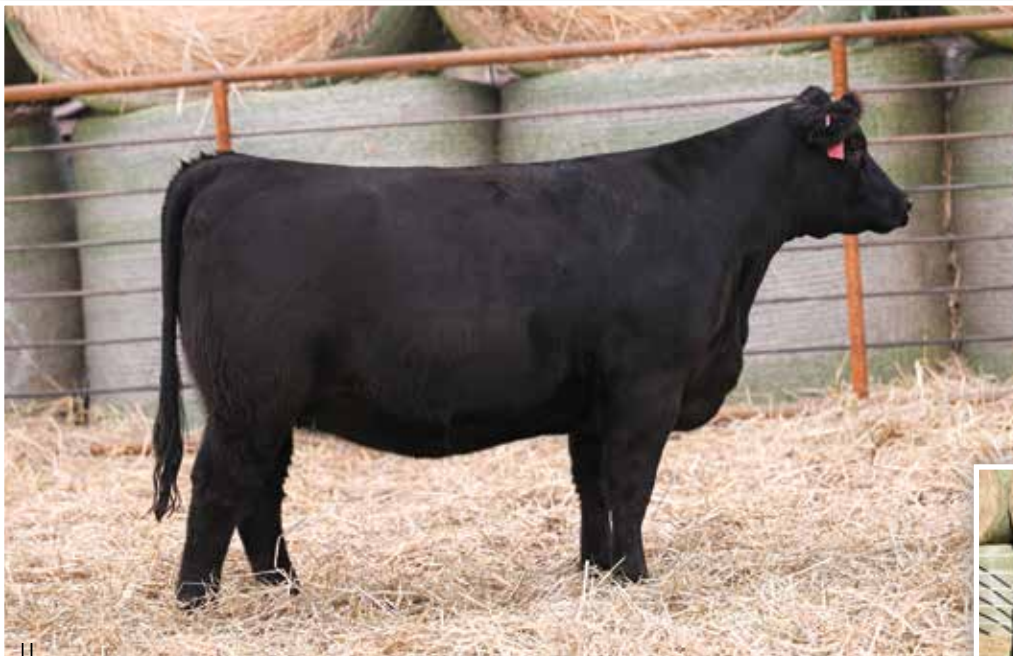
LOT 21 - BFJV SHANIA'S REMEDY K209