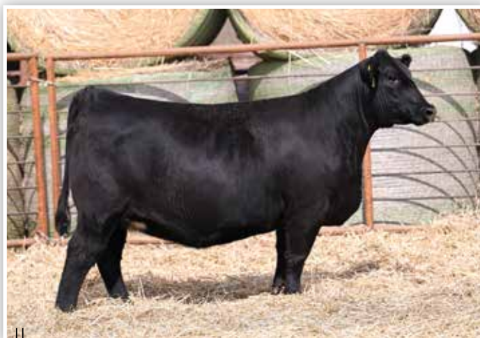
LOT 5 - BFJV MS REMEDY K250

One of the favorites of many that have been through the sale offering, and we certainly cannot argue! This SO Remedy 7F daughter is so refined about her head and neck yet doesn't sacrifice and an ounce of power and substance. This high volume female is loaded with capacity and dimension from her shoulder back. She sells safe to W/C Cyclone 385H!