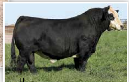
W/C BANKROLL 811D $205,000 SIRE OF LOT 81

Another standout red hided brood cow that is sired by W/C Bankroll 8911D. Her dam is productive daughter of the triple crown winning MR HOC Broker, the dominant sire of champions and high sellers! She is one of the stoutest featured females in the sale. We have always admired the heaviness of structure, pin width, and genuine shape that she possesses. Another beautiful female safe in calf to the incredible STCC Tecumseh 058J!