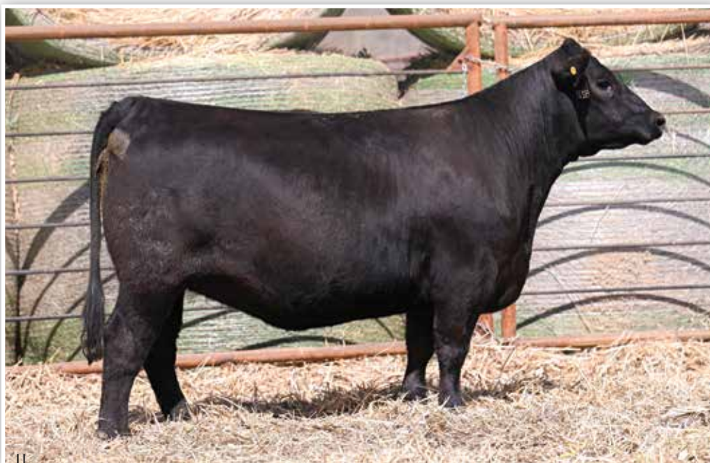
LOT 140 - A&B LASS 2081

2081 is a daughter of Myers Fair-N-Square M39 that is backed by the influence of Casino Bomber N33. She is robust bodied, easy keeping, and offers a number profile that is simply unrivaled! She ranks top 3% WW, top 10% YW, top 15% YH, top 4% MW, top 2% MH, top 10% CW, top 20% Marb, top 10% $F, top 20% $G, top 10% $B, and top 25% $C.