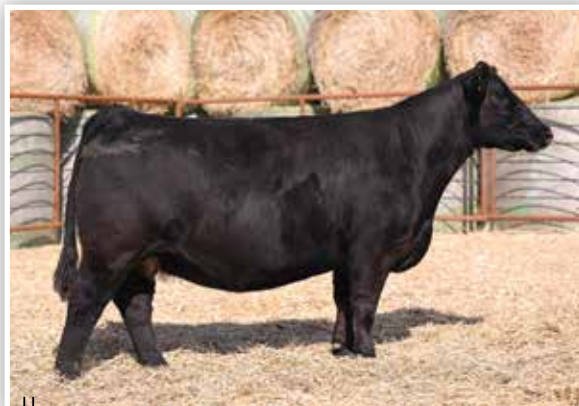
BFJV RUTH'S BANKROLL H300 DAM OF LOT 1 & 2 - SHE SELLS AS LOT 99