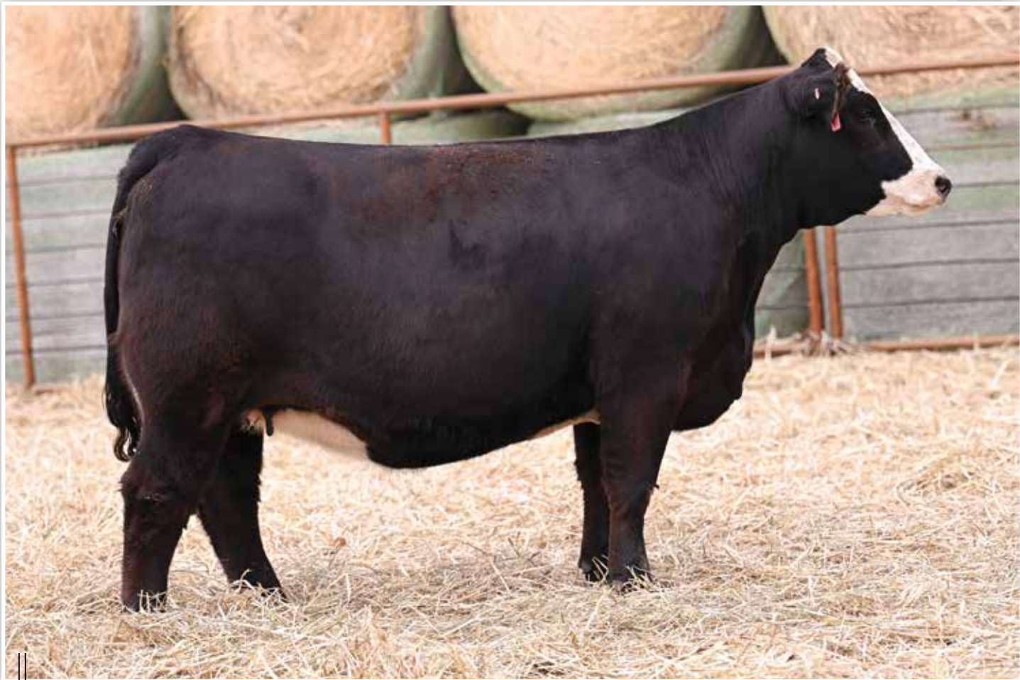
LOT 56 - BFJV MS HIGH RISE K261