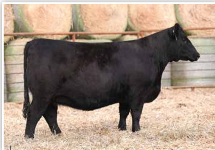
LOT 39 - BFJV MS CYCLONE K207

K207 is certain to be on many short lists on sale day! Her abundance of body mass, density, and overall dimension is simply unrivaled. She merges this extra volume and capacity with such a feminine and refined look about her front third. Her mating to TL Ledger is certain to be a homerun!