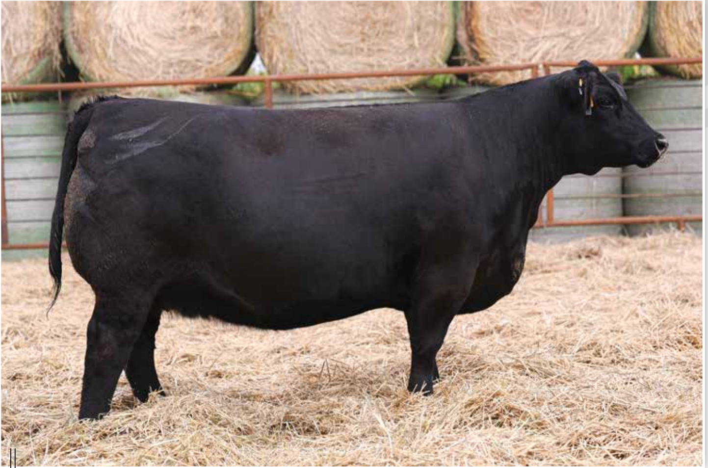
LOT 88 - BFJV SHANIA'S LEDGER F973