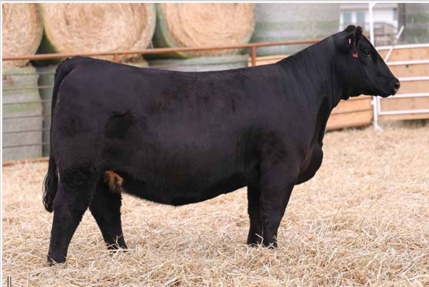
LOT 1 - BFJV RUTH'S REMEDY K243