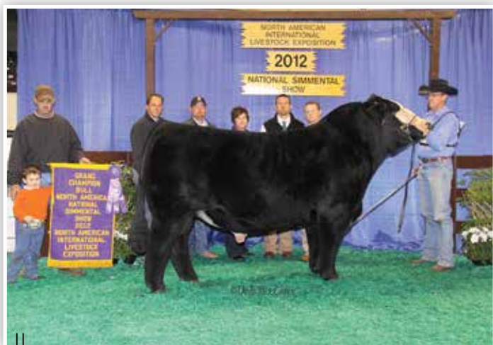
MR HOC BROKER - TRIPLE CROWN WINNING FULL BROTHER TO DAM OF LOT A3