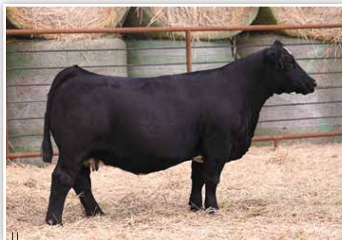
|| LOT 102 - KBC MISS BANKING 9281G

BFJV Ms Bankroll H333 is a young, longer sided, bigger outlined Bankroll 811D daughter with a fancy painted face and elevated and eye-catching look. We think her kind aligns perfectly to generate a very special, three quarter blood show heifer prospect sired by the exciting FRKG Classic 948K.