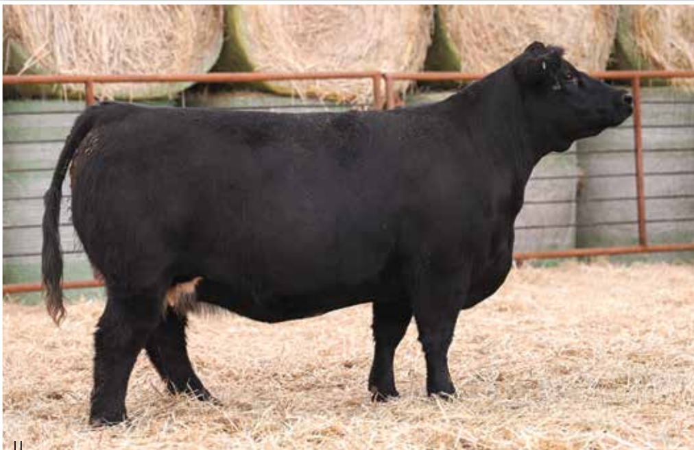
LOT 151 - BFJV MS 47

Power, shape, and unique in terms of her natural dimension... allow us to introduce you to a beast of a brood cow in this direct daughter of the great Monopoly! There is no doubt that this female has the parts and pieces to yield elite show steers if mated accordingly. She is so soft made, bold centered, and stout hipped from behind. She is confirmed safe in calf to BVJF Margin D9040 with sexed female semen! The Irish Whiskey, MR HOC Broker, Monopoly genetic combination has proven time after time that there is not a more potent maternal mating for generating females with the credentials to yield elite show steers!