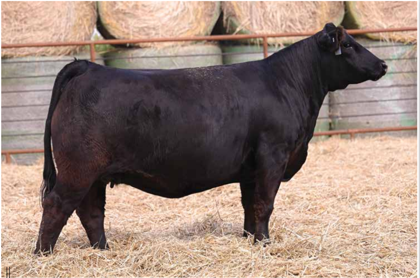
LOT 96 - BFJV MS DRIVER 43H

Old school cool! There is no doubt that WAGR Driver 706T has secured his place in the industry as one of the all-time most influential maternal Simmental sires. Countless daughters have served as the foundation for successful breeding programs. The dam of WAGR Driver 706T, 3C Melody M668 BZ, is one of the highest dollar generating and most important females in the history of the Simmental breed. She sells safe to the $620,000 world record selling STCC Tecumseh 058J!