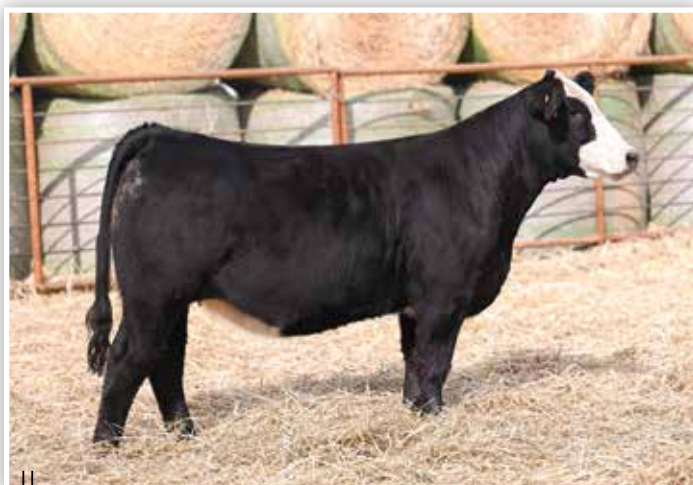
LOT 26 - BFJV MS BANKROLL K289

K270 is a massive centered daughter of W/C Bankroll 811D that is safe in calf to the $210,000 FRKG Classic 948K. This brockle faced female is a must see on sale day if you're serious about finding a Percentage Simmental female to build a program around!