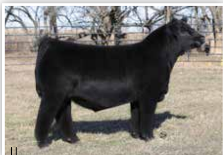
STCC TECUMSEH 058J SIRE OF LOT B1