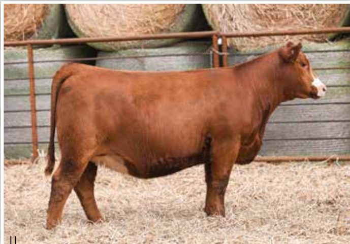
LOT 75 - BFJV MS HIGH RISE K283