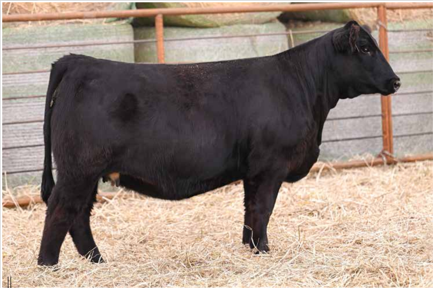
LOT 3 - SWSN MS REMEDY 71K

DONOR ALERT! Ladies and gentlemen, we present a very high quality Purebred female sired by the 2021 Cattlemen's Congress Grand Champion Purebred Simmental Bull, SO Remedy 7F. Her dam is the result of the ACLL Fortune 393D x MR CCF 20-20 genetic combination. 71K is so smooth and elegant about her front third yet offers an unmatched amount of center body shape and power from behind. She sells safe in calf to the $100,000 Conley High Rise F3, one of the leading calving ease prospects in the breed. The dam of Conley High Rise F3, Conley Sheza Star D3, recently topped the Simmental division of the Conley Cattle Fall Production Sale where she commanded $120,000 to Lindskov's LT Ranches and Aces Wild Ranch! Maternal excellence sells all-inclusive with 71K!