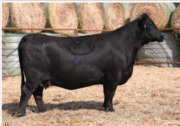
LOT 186 - BFJV MS 898