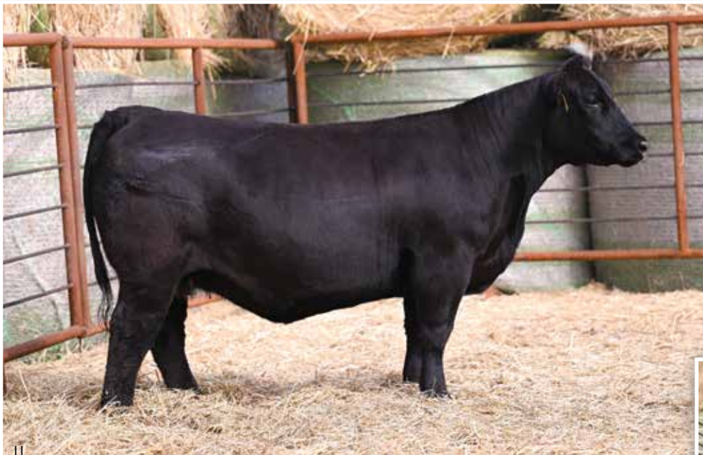
LOT 85 - BFJV SHANIA'S PROFIT J2058

A paternal granddaughter of Profit that offers the influence of Ms Shania 6D, one of the most lucrative females to ever call home to Bruhn Cattle Company. J2058 is a stout featured, ultra-attractive female that is extended about her front third.