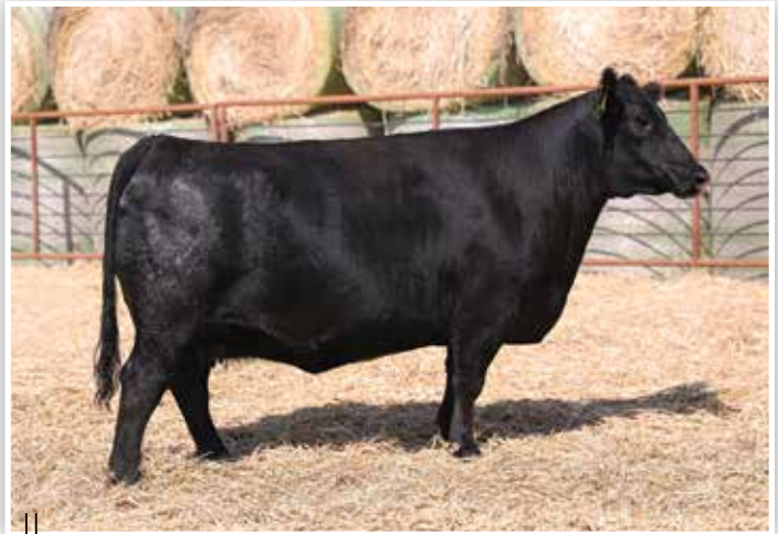
LOT 154 - BFJV MS 56

Undeniable in terms of her volume, capacity, and overall mass. This nonregistered Angus female has the extras in terms of substance and shape to generate elite show cattle. She is safe in calf to the iconic In God We Trust with a confirmed heifer calf on the way!