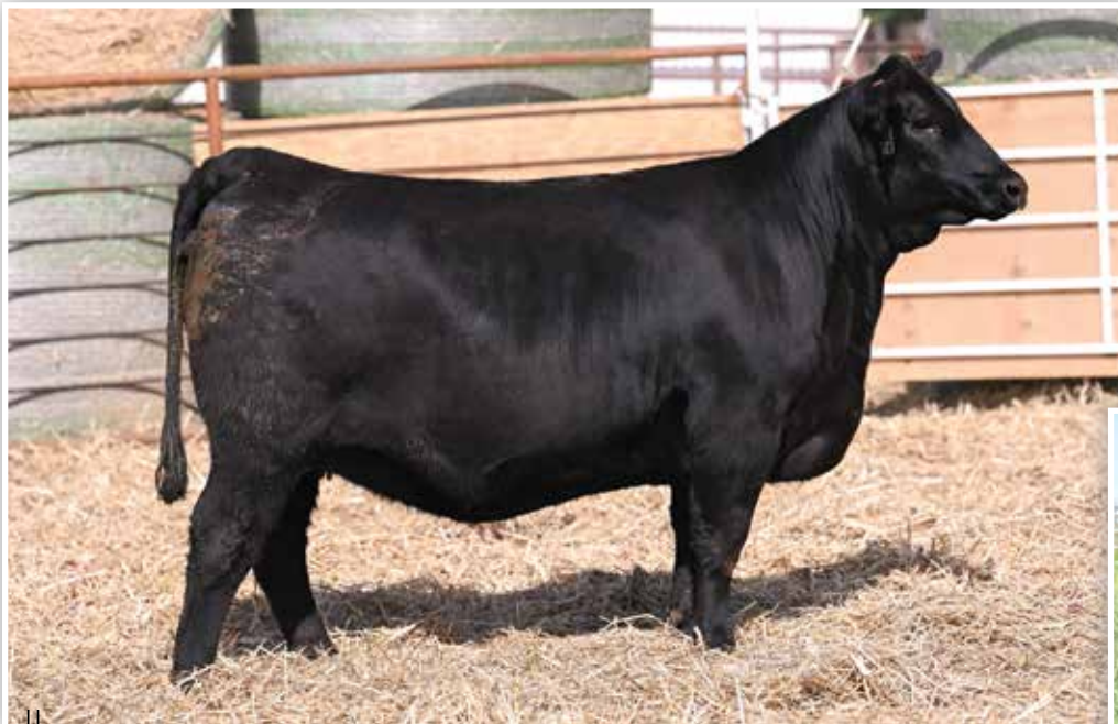
LOT 139 - A&B LUCY 2108

A&B Lucy 2108 is by EXAR Stock Fund 9097B and backed by the influence of KMK Alliance 6595 I87, the Sitz Alliance 6595 son. She is an easy keeping, ultra-broody female that is sound built and offers an abundance of volume. She ranks top 20% WW, top 20% YW, top 15% YH, and top 30% CW. She sells safe in calf to the $210,000 FRKG Classic 948K for a BIG return on investment!