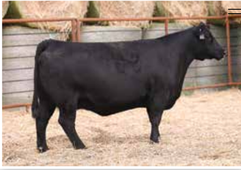
LOT 219 BFJV MS 0901