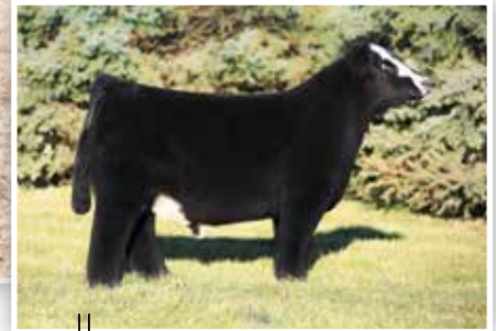
GOOD AS IT GETS SIRE OF LOT 150