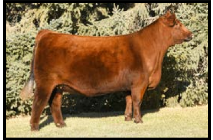
ROJAS NAVARRE 6054 MATERNAL SISTER TO DAM OF LOT 26

Another son of the Thomas Ranch herdsire influenced by the great Red Fine Line Mulberry 26P. This stud comes with a 75-pound actual BW, double digit CED, and more than acceptable on his WW and YW values. This bull is also one of the top ribeye bulls in the red offering with a 111 REAR that measures over a 14. Very impressive with all of the goods.