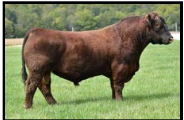
MLK BIG FOOT SIRE OF LOT 33

Big, long performance sire recording over 750 pounds of weaning weight. Pay attention. The big cattle are worth more, especially in today's marketplace.