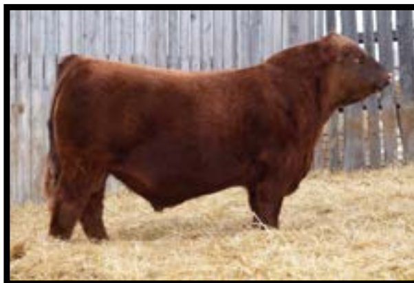
RED RAINBOW TRANSCENDENCE 29B SIRE OF LOT 41

Certainly a moderate birth weight son of Red Rainbow Transcendence with nearly 650 pounds of WW and top third expected values for CED and BW.