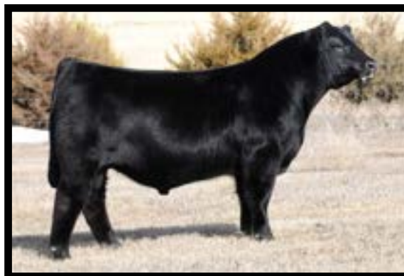
W/C RELENTLESS 32C PATERNAL GRANDSIRE OF LOT 53

As a sire group, the cattle by W/C Lock Down have maintained a high level of demand for a multitude of years. They are known for their sensible to low birth with an all-inclusive explosive growth and conversion pattern that has yet to be replicated.