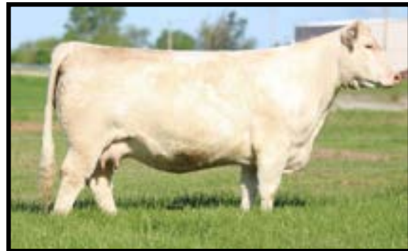
WC SWEETHEART 3505 DAM OF LOT 20

A direct son of our herd bull generating deluxe, WC Sweetheart 3505. The maternal power on either side of this stud's pedigree mean he will generate a tremendous set of replacement females. If you plan to retain heifers out of your herd bull purchase then pay serious attention here.