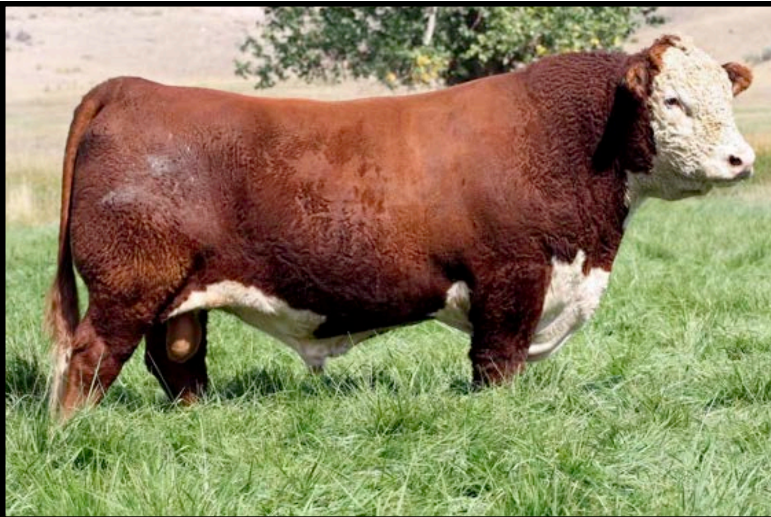
NJW 73S W18 HOMETOWN 10Y ET MATERNAL GRANDSIRE OF LOTS 56-59