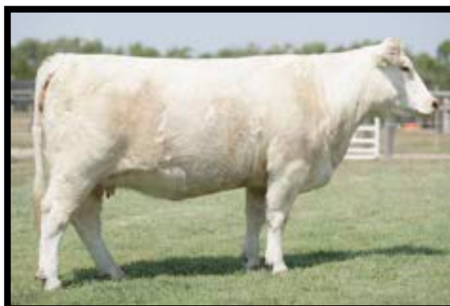
TR MS MONTELLA 1572Y PATERNAL GRANDDAM OF LOT 13