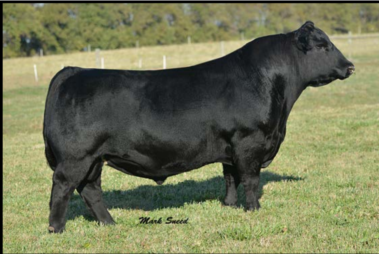
PVF INSIGHT 0129 MATERNAL GRANDSIRE OF LOT 46