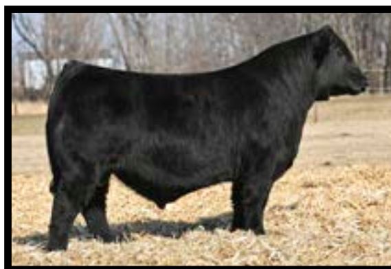
CKCC LINCOLN 0631H ET SIRE OF LOT 55

The TMAS Can't Touch This 8531F sire group has been one of standout status for S&S Simmental and Thomas Ranch alike. As a past sale feature and high seller for TR, Can't Touch This sires width, power, size, and scale with added substance. Tie in with confidence.