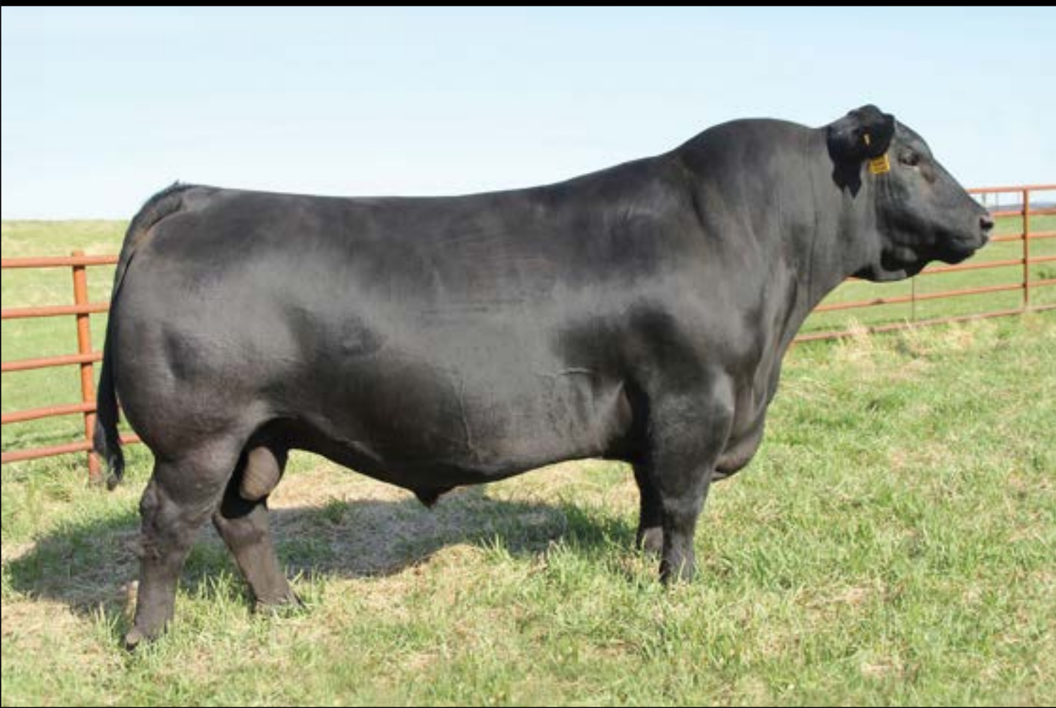
S A V RESOURCE 1441 PATERNAL GRANDSIRE OF LOT 44-47