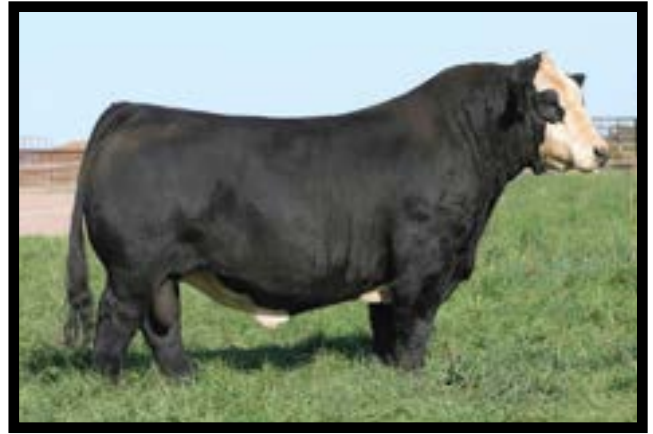
W/C BANKROLL 811D $205,000 PATERNAL GRANDSIRE OF LOTS 48-50

This bull comes to you maternal in his lineage with the absolute best SimGenetics for fescue tolerance. Take notice of his 700 plus weaning weight as well.