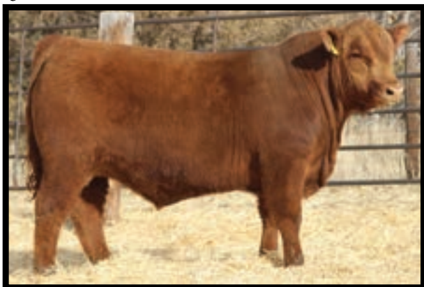
PIE RESOURCE 0229 SIRE OF LOT 40

The influence of the great Red MRLA Resource 137E is always a plus when evaluating Red Angus stock as they tend to be some of the better cattle in the business. This one is of serious consideration based on type, kind, and genetics.