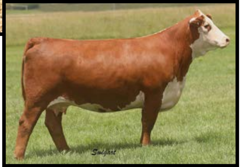
CHURCHILL LADY 6124D ET DAM OF LOTS 56-59