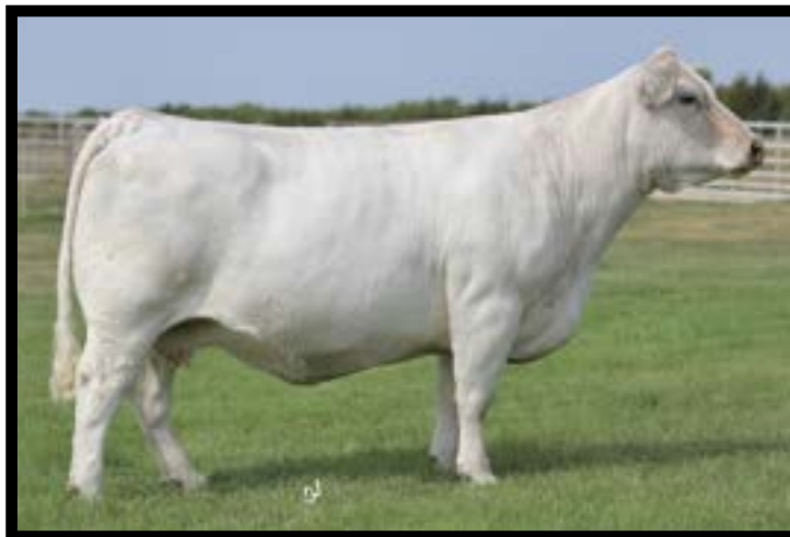
M&M MS CARBINE 1567 PLD LEGENDARY PATERNAL GRANDDAM OF LOTS 1-12

The $600,000 valuation M&M Outsider 4003 Pld is represented by four impressive sons– these cattle flat work! Solid genetics are found on either side of the pedigree here. You will find that this stud came with only 77lbs at birth and sports an EPD profile highlighted by a top 30% BW, top 40% REA, top 45% CW and top 50% WW & YW.