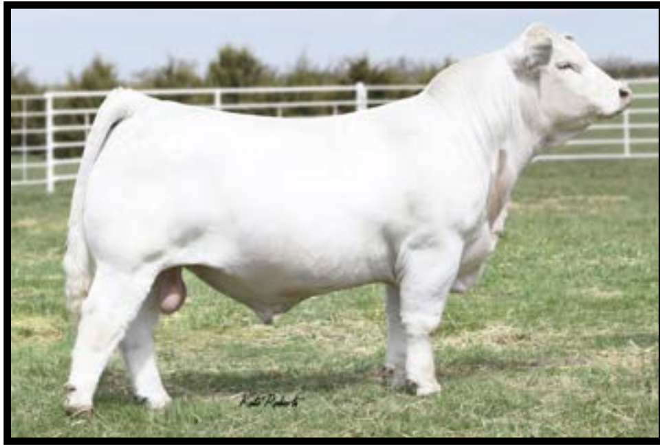
TR CAG CARBINE'S VISION 9700 ET DAM OF LOT 1