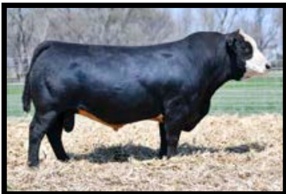
W/C LOCK DOWN 206Z SIRE OF LOT 52