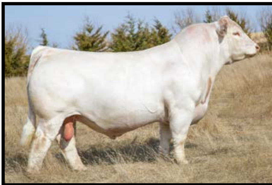
TR CAG CARBON COPY 7630E ET SIRE OF LOT 5

We think this TR CAG Carbon Copy 7630E ET son offers lots of value as a growth specialist. Not only can you trust in his top 30% BW, but you can expect his progeny to grow with his top 40% WW ranking. He came to the weaning pen with an impressive 676lbs WW that ranks him towards the top end of these Charolais bulls.