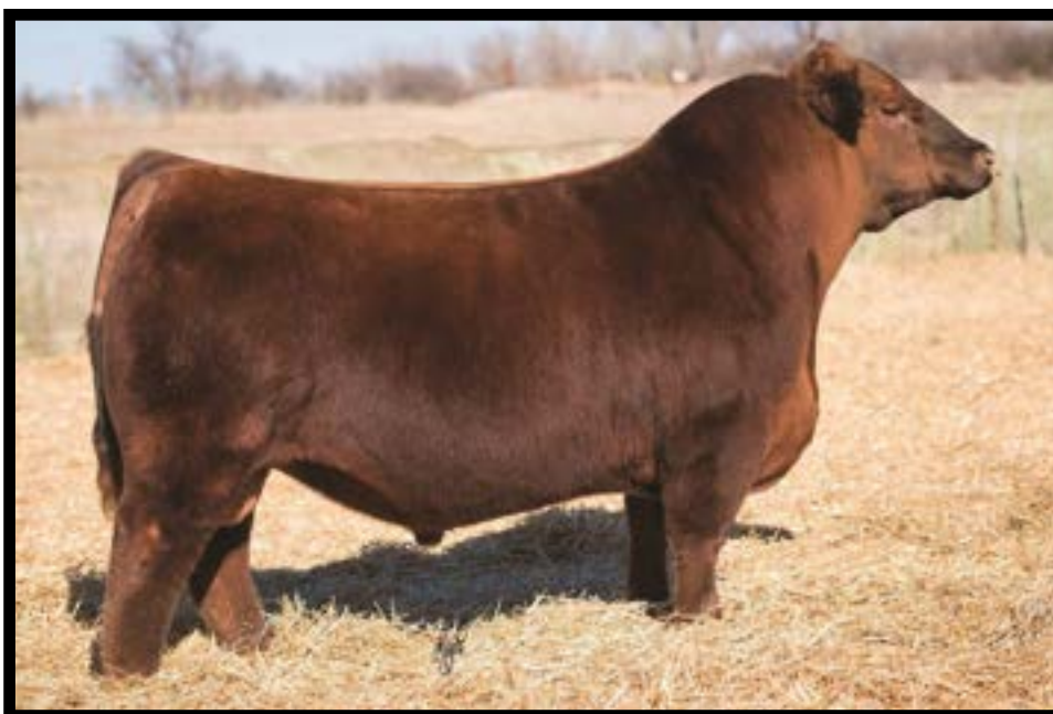
MF POKER FACE 7862 SIRE OF LOT 34-36