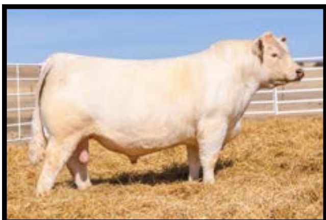
TR MR FOREIGNER 9987G ET SIRE OF LOT 13

A light birth weight bull with a bold build and plenty of depth of body. This uniquely bred son of TR MR Foreigner 9987G ET sports a calving ease profile that includes a top 30% BW EPD. He came with an actual 75lbs actual birth weight.