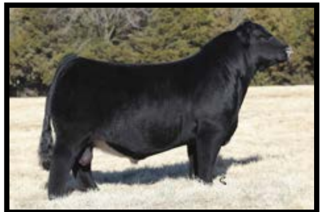
GEFF COUNTY O SIRE OF LOT 51