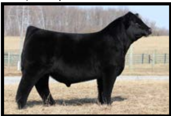
TMAS CAN'T TOUCH THIS 8531F SIRE OF LOT 54

If you prefer long bodied, heavy feeder cattle that will respond and convert, this Relentless influenced stud will do the job. Great cows make great bulls here again.