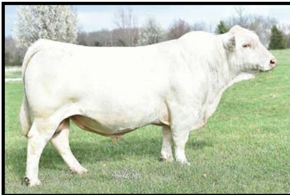
LT RUSHMORE 8060 PLD PATERNAL GRANDSIRE OF LOTS 14-18