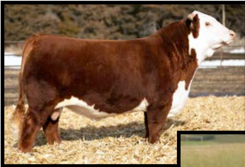
SR DOMINATE 308F ET SIRE OF LOTS 56-60