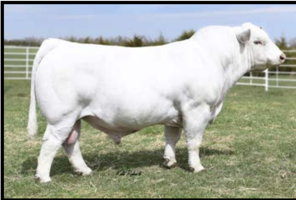
M&M OUTSIDER 4003 PLD $600,000 SIRE OF LOTS 1-4