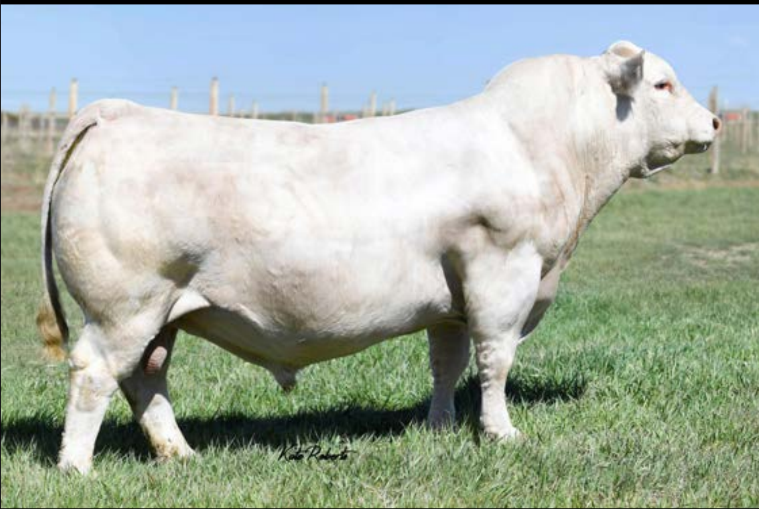
LT AFFINITY 6221 PLD SIRE OF LOTS 14 & 15