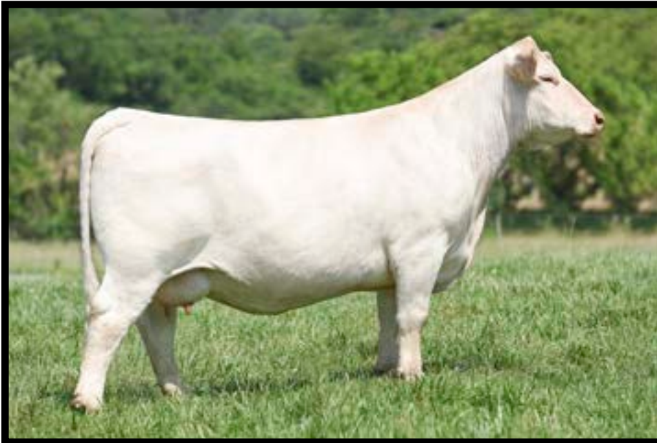
BOY SMOKIN MONTE 7311 DAM OF LOT 1