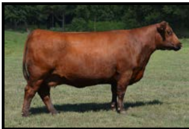
RED BAR-E-L KASSIE 117X DAM OF LOT 29

A Trump son with the merits for a calving ease bull with a 65-pound actual birth weight and a complimentary weaning weight over 620. Rancher tested and will be rancher approved.