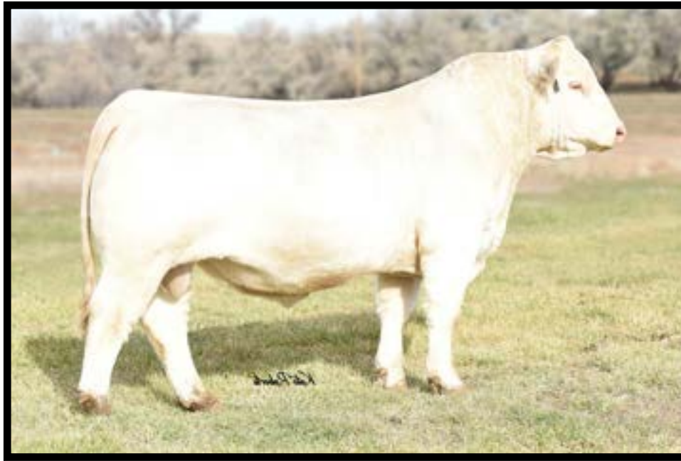
LT AUTHORITY 7229 PLD PATERNAL GRANDSIRE OF LOTS 14-18