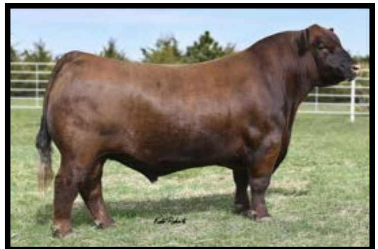
ROJAS TR CHIVAS 17109 SIRE OF LOT 27 & PATERNAL GRANDSIRE OF LOT 28

Extreme low birthweight sire that can be used on heifers. This stud is also top 10% HB and is from a very productive young female.