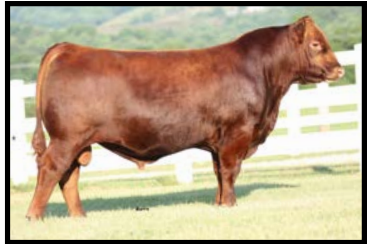
ERKS MULBERRY 9918 SIRE OF LOTS 25 & 26

Negative BW with a double digit CED should make this stud acceptable for use on heifers as he ranks in the top third of the breed for those convenience traits. His cattle should experience industry acceptable conversion as well with an ADG value in the top 25% of his contemporaries.