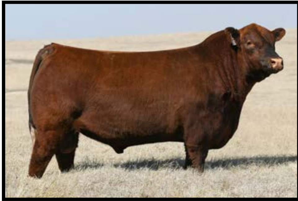
MANN RED BOX 55C SIRE OF LOTS 31 & 32