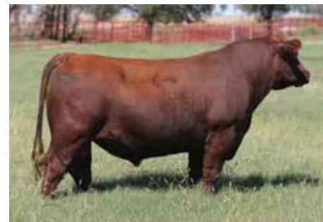
PIE NEW TERRITORY 523 PATERNAL GRANDSIRE OF LOT 69