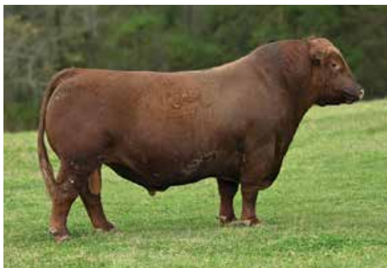
4MC KING OF THE COWBOYS 706 - $210,000 VALUATION SIRE OF LOTS 1-7