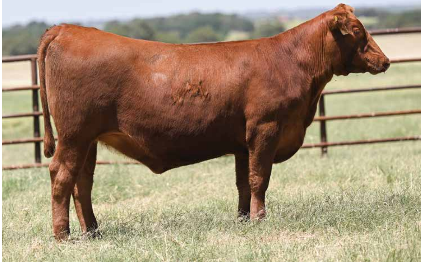
4MC BOTEET 2325E