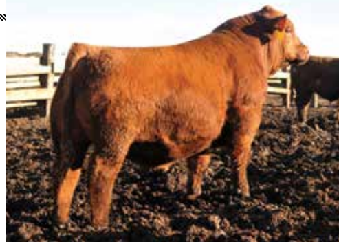
9 MILE BLOCKOUT 7102 - MATERNAL GRANDSIRE OF LOT 18

HXC CONQUEST 4405P PFFR SUN CAN 8X LSF OPTIMISM 1107Y PIE JULY DALLES 197 5L BLOCKADE 2218-30B C-BAR ISABEL 513C PIE THE COWBOY KIND 343 RED MOON MADISON