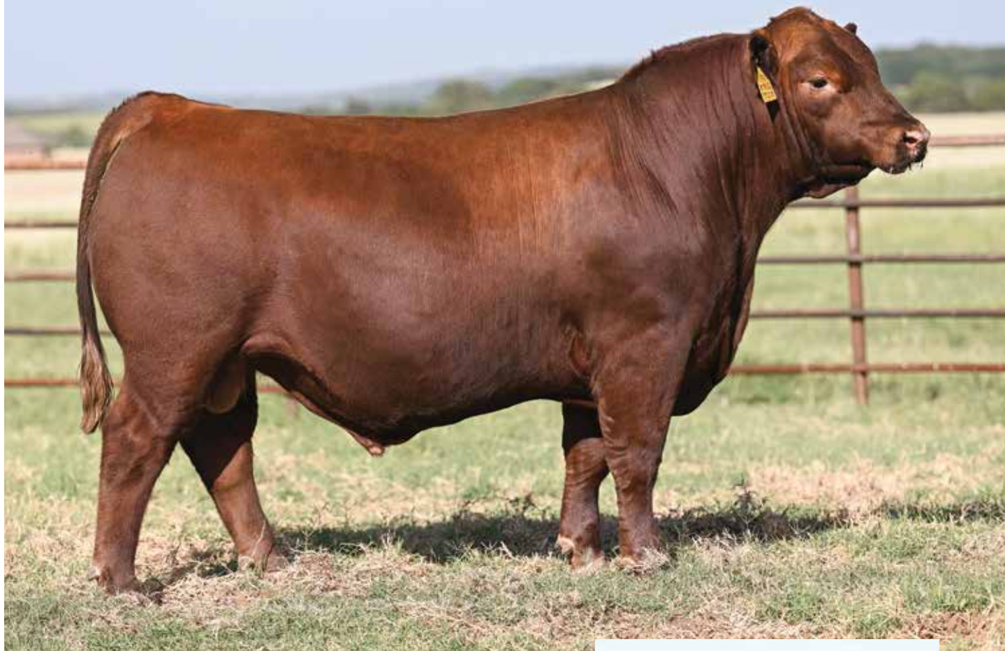
4MC CONVOY 2183