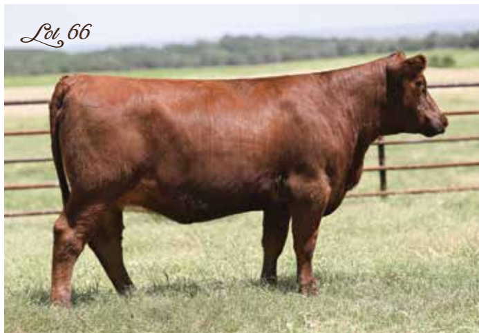
4MC FIREFLY 2107