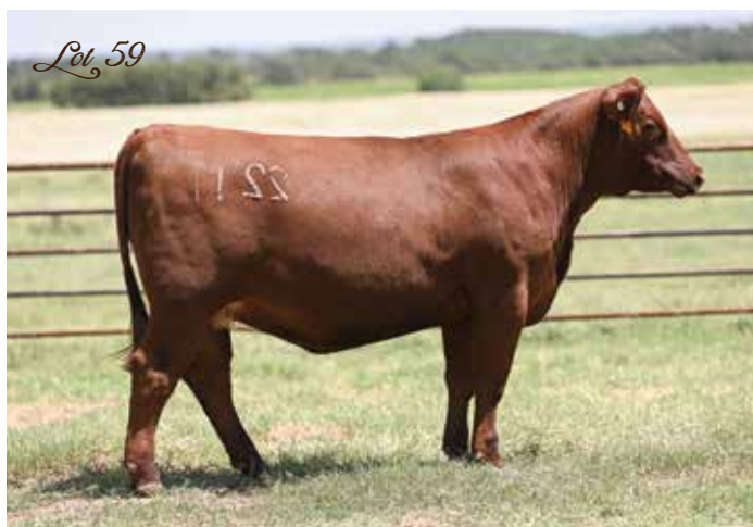
4MC MISS CHERRY 2211