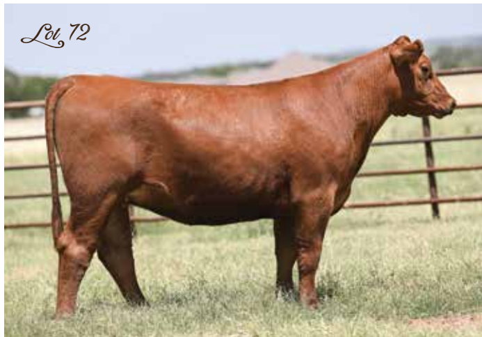
4MC GAZELLA 2094