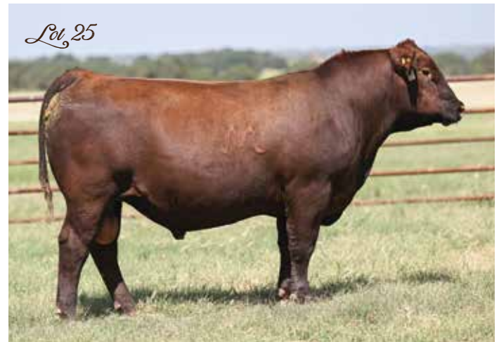
4MC FULLBACK 2180

PIE CINCH 4126 PIE MS PATRIOT 536 LCB HOSS A444N PIE STORMY BEEFMAKER 327 LSF SAGA 1040Y 4MC ANN GANG 231 RED LAZY MC REDMAN 20X 4MC QUEEN