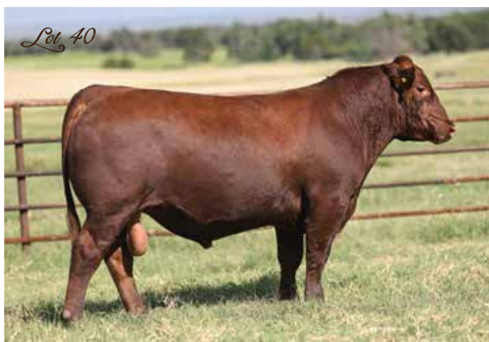
4MC NEW TERRITORY 2079