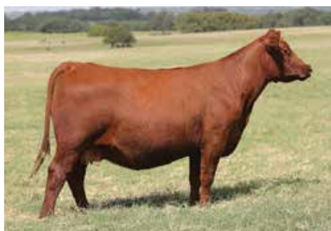
4MC MISS CHERRY 828 - DAM OF LOT 59 & MATERNAL SISTER TO LOT 60