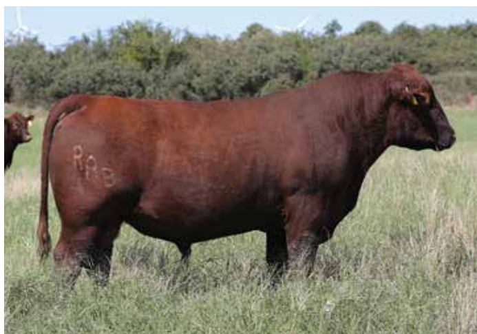
BIEBER FUSION C194 - SIRE OF LOTS 64-68