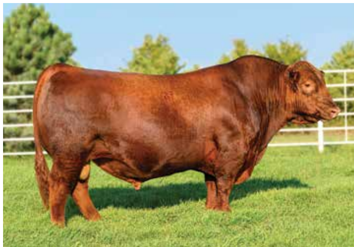
PIE QUARTERBACK 789 - $155,000 SIRE OF LOT 52

LSF SAGA 1040Y PIE LAKOTA 046 PIE ONE OF A KIND 352 PIE RUBY 381 BECKTON EPIC R397 K LSF COUNTESS 925R U8133 4L MAKE A VISION 49T PIE BOTEET 752