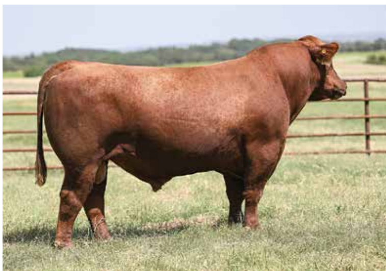
PIE QUARTERBACK 0180 - SIRE OF LOT 15