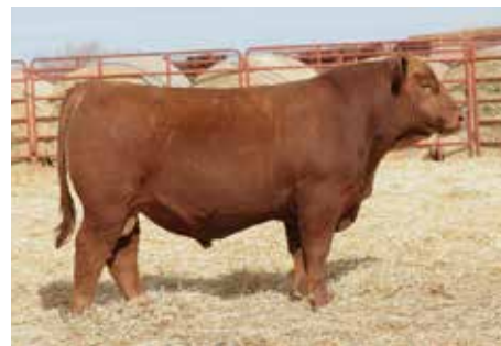
4MC BLOCKOUT 1133 - $9,300 MATERNAL BROTHER TO DAM OF LOT 28 PURCHASED BY STANLEY DUNBAR