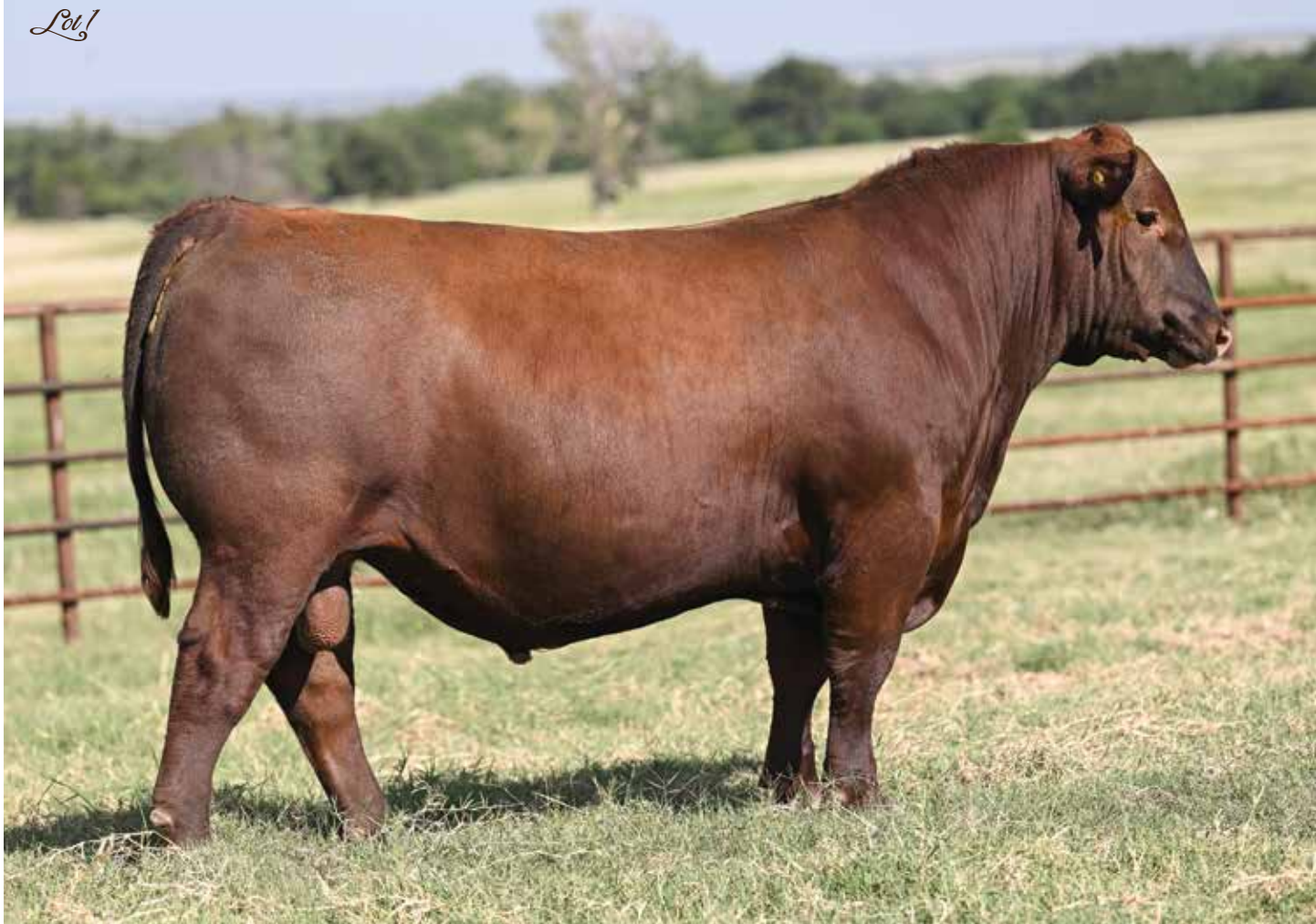
4MC KING OF THE COWBOYS 2112