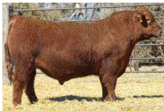
PIE CONVOY 7058 - SIRE OF LOTS 16-20