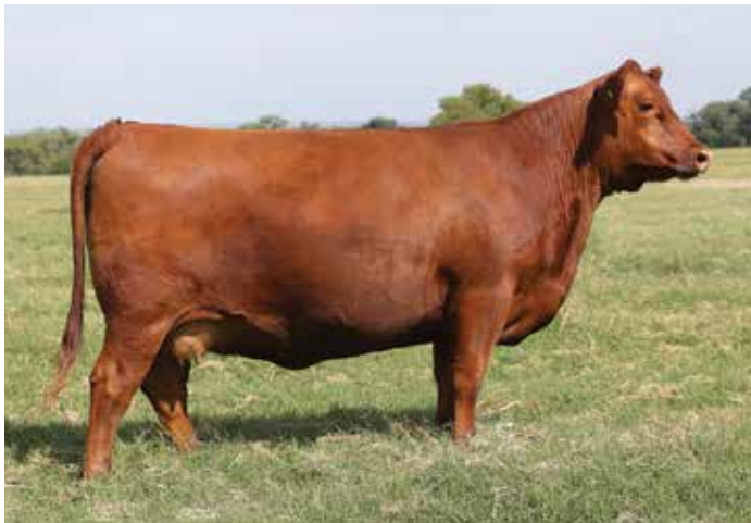
4MC SUNBURST 903

A DAUGHTER OF 9 MILE FRANCHISE 6305 WORKING AT MCENTIRE RED ANGUS!