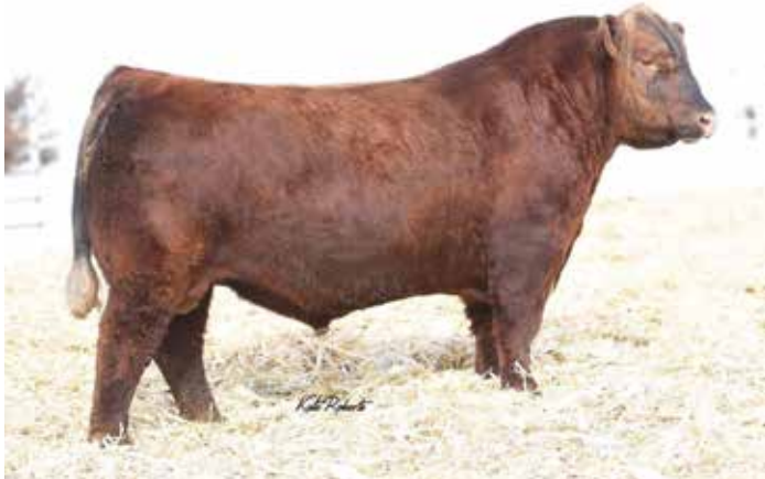
PIE FULLBACK 7005 - $135,000 PATERNAL GRANDSIRE OF LOTS 21-30