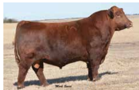
PIE THE COWBOY KIND 343 MATERNAL GRANDSIRE OF LOTS 20-23