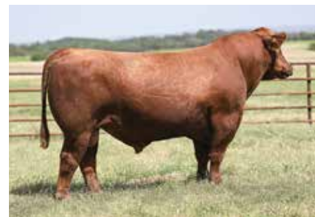
PIE QUARTERBACK 0180 SERVICE SIRE TO SEVERAL FEMALES THROUGHOUT THE OFFERING!