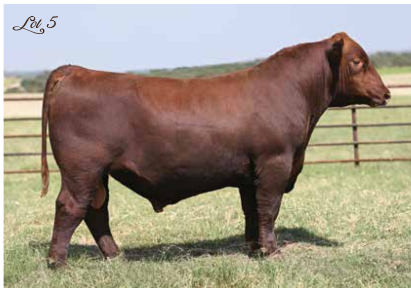
4MC KING OF THE COWBOYS 2149