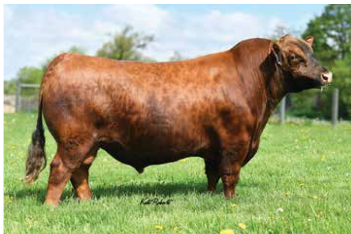
9 MILE FRANCHISE 6305 - $105,000 SIRE OF LOTS 31 &amp; 32

SPUR FRANCHISE 7070 H & H IRENE LASS 0135 TR COLT 45 UT806 C-BAR & BROWN ABIGRACE T712 ANDRAS NEW DIRECTION R240 PIE CENTENNIAL FORTUNE 3330 LSF OPTIMISM 1107Y REAL DALLIES