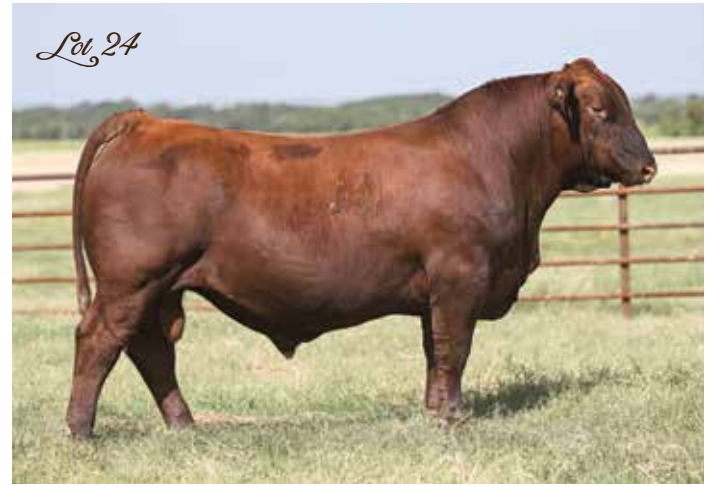
4MC FULLBACK 2223

PIE CINCH 4126 PIE MS PATRIOT 536 LCB HOSS A444N PIE STORMY BEEFMAKER 327 LSF SAGA 1040Y 4MC ANN GANG 231 FEDDES BIG SKY R9 C-BAR H7106 TILLY R542