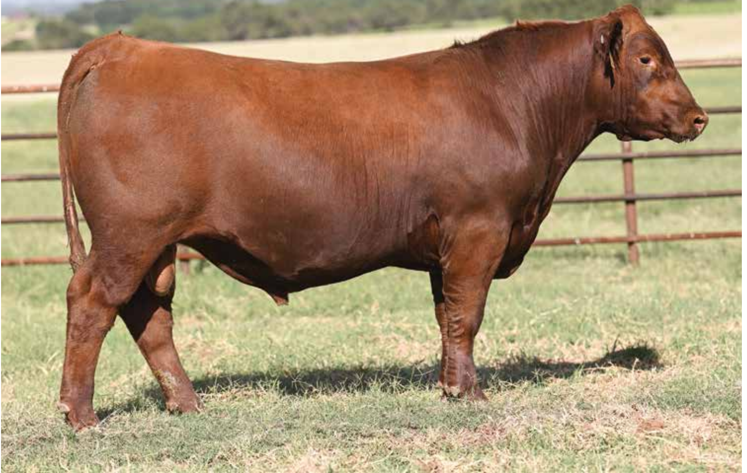
4MC FULLBACK 2237