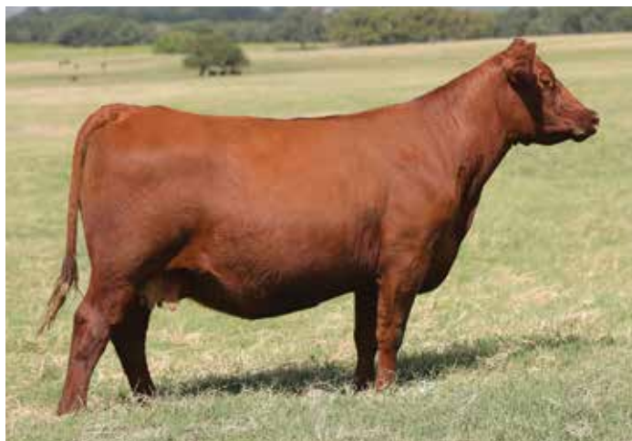
4MC MISS CHERRY 828 - AN EXAMPLE OF THE MATERNAL EXCELLENCE FROM THE PIE NEW TERRITORY 523 SIRE LINE!

"I have used McEntire Red Angus bulls for the last several years with great success. Not only are the bulls easy to be around, but also they perform and their progeny performs. We retained ownership on our steers and were very pleased with how they fed. They weighed 1466 at harvest and gained 3.88 lbs. per day with a .70 cost of gain. We will continue to use McEntire Red Angus bulls to achieve this success."