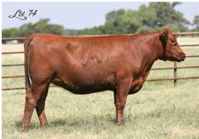
4MC JORDAN 207