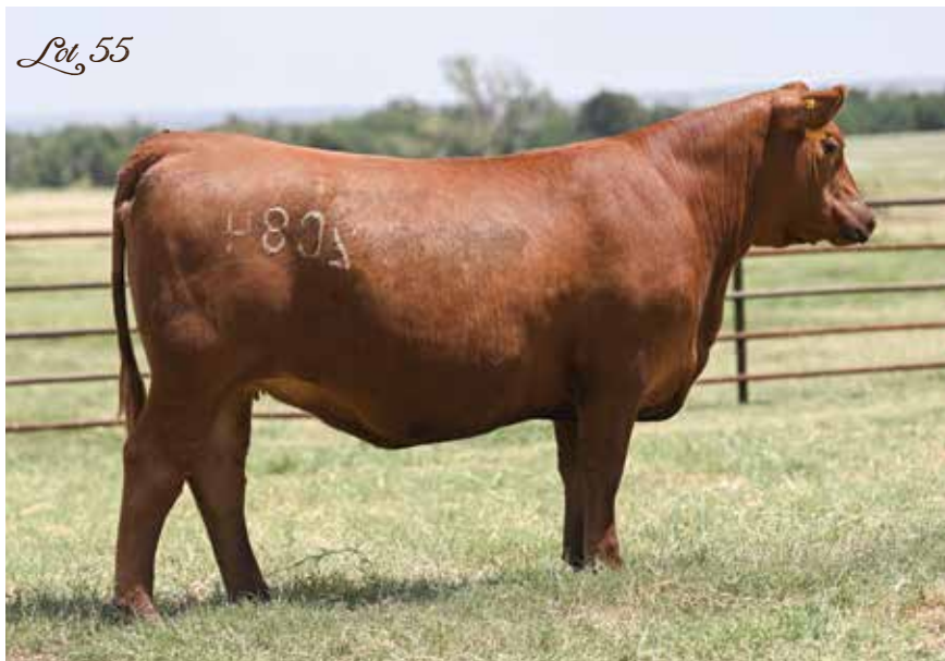
4MC SHOCKER SUE 2084