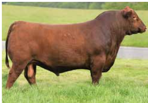
4MC THE COWBOY WAY 970 - $25,000 SIRE OF LOTS 72 & 73