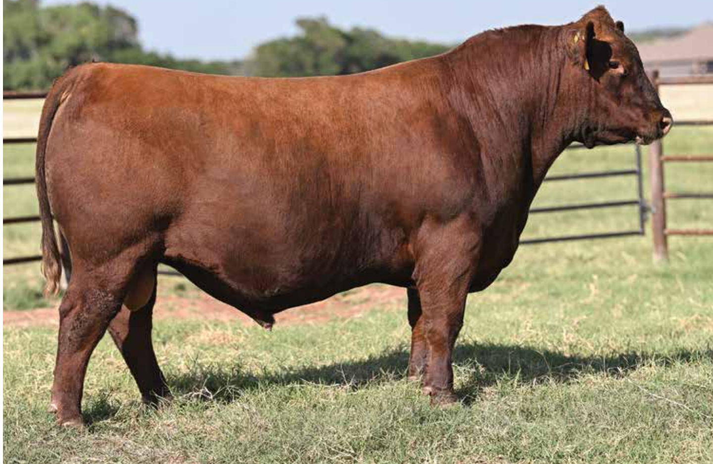
4MC FRANCHISE 2008