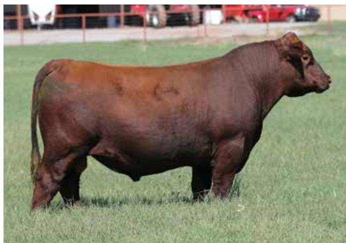
PIE NEW TERRITORY 523 - PATERNAL GRANDSIRE OF LOTS 35 &amp; 36