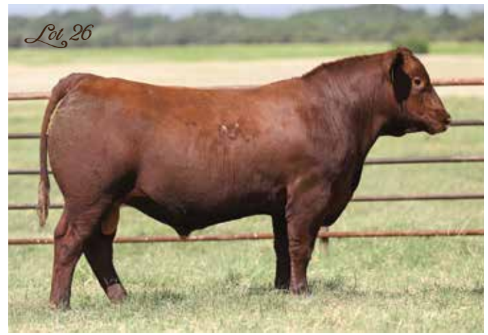
4MC FULLBACK 2119

PIE CINCH 4126 PIE MS PATRIOT 536 LCB HOSS A444N PIE STORMY BEEFMAKER 327 ANDRAS NEW DIRECTION R240 PIE CENTENNIAL FORTUNE 3330 PIE THE COWBOY KIND 343 SOR BRASKA FI T870