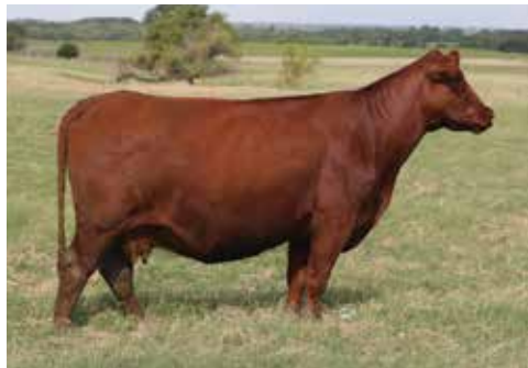
4MC MISS CUB 791 - MEMBER OF THE CCR MISS CUB 658-713 COW FAMILY!