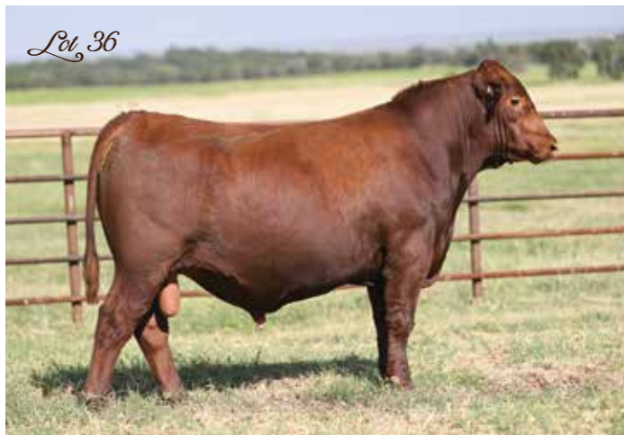
4MC NEW TERRITORY 2202