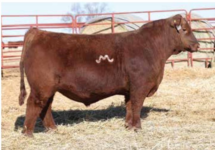
4MC BLOCKBUSTER 1217 $25,500 MATERNAL BROTHER TO LOT 1 PURCHASED BY HANSINE RANCH