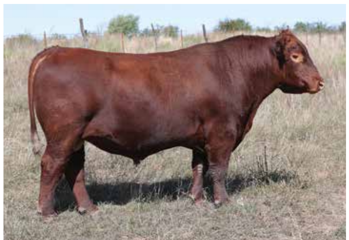
JEFFRIES REDDINGTON 865C - SIRE OF LOT 43