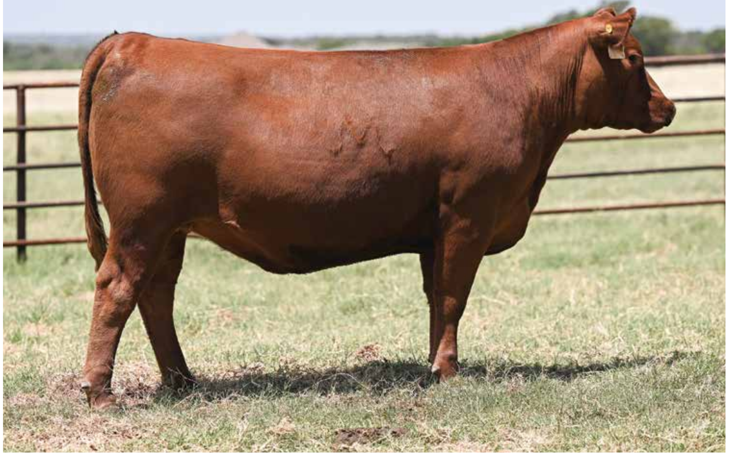
4MC BOTEET 2003