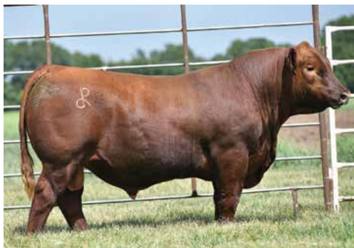
The Best Female Offering