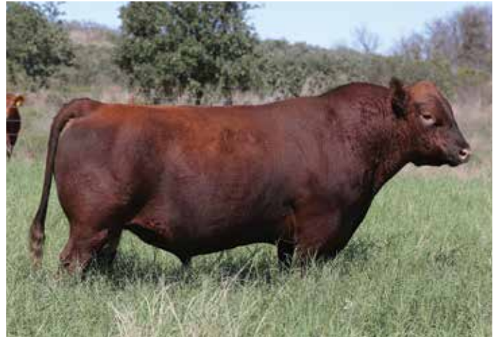
LSF SAGA 1040Y - SIRE OF LOT 60

BECKTON EPIC K F075 BECKTON KIT F468 JL FEDDES BIG SKY R9 LSF MINOLA K1279 T7172 LCB HOSS A444N PIE MADONNA ADVANCE 4504 BUF CRK CHEROKEE N009 CCR HI VOLTAGE 823-126B