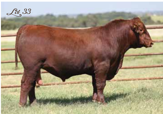
4MC WEIGH UP 2241