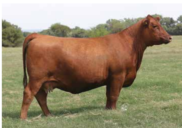
4MC MS PRECISION 952 - ONE OF THE FIRST DAUGHTERS BY 4MC KING OF THE COWBOYS 706. HE WILL CONTINUE TO SEE HEAVY USE IN OUR PROGRAM!