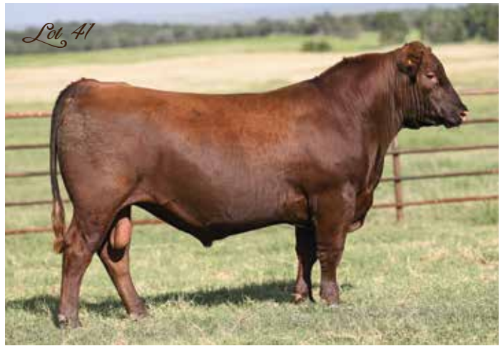
4MC NEW TERRITORY 2113