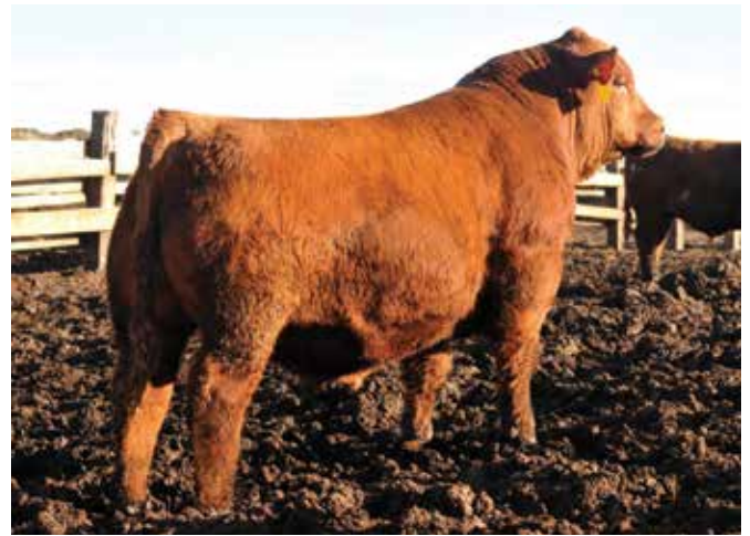
9 MILE BLOCKOUT 7102 - PATERNAL GRANDSIRE OF LOTS 48-50

9 MILE BLOCKOUT 7102 4MC BLOCKOUT 976 BD: 1/13/22 Reg: 4667375 A - 100% AR Tattoo: 205 4MC MOON 3135 PIE NEW TERRITORY 523 4MC SUE MIATY 856 4MC SUE MIATY 502 5L BLOCKADE 2218-30B C-BAR ISABEL 513C FAT RAMBO RED MOON MADISON ANDRAS NEW DIRECTION R240 PIE CENTENNIAL FORTUNE 3330 LSF PROSPECT 2035Z TKP MIATY 325