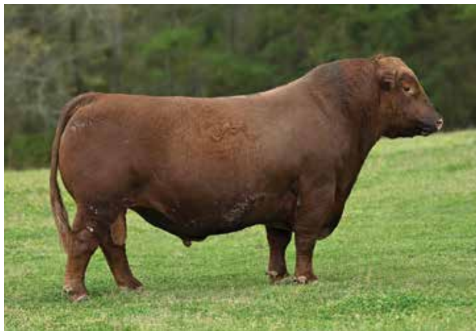
4MC KING OF THE COWBOYS 706 - $210,000 FULL BROTHER TO DAM OF LOT 38