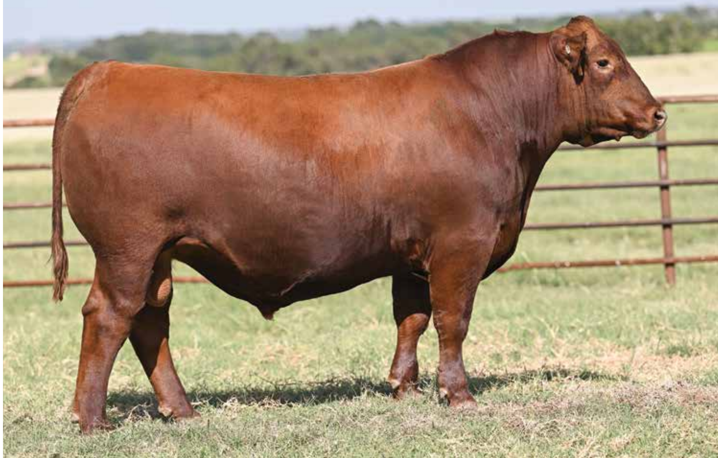
4MC NEW TERRITORY 2234