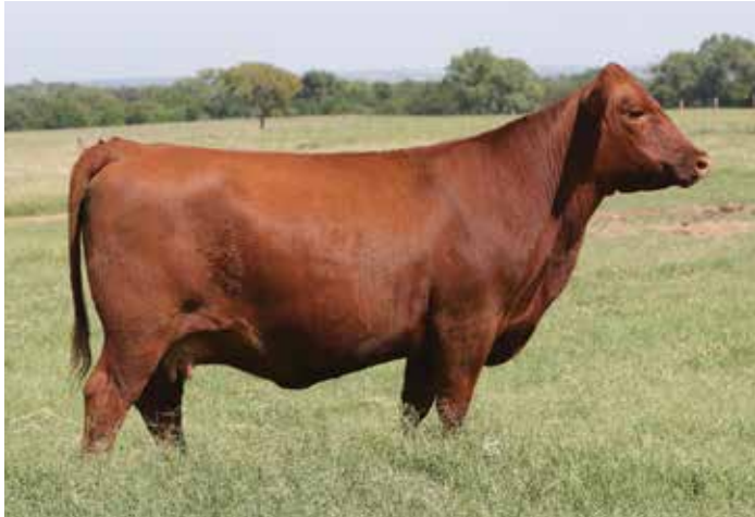
4MC KARUBA 940 - A DAUGHTER OF PIE THE COWBOY KIND 343, ONE OF THE BEST MATERNAL SIRES WE HAVE EVER USED!