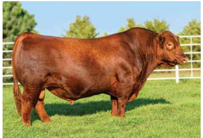
PIE QUARTERBACK 789 $155,000 SIRE OF LOTS 8-14

LSF SAGA 1040Y PIE LAKOTA 046 PIE ONE OF A KIND 352 PIE RUBY 381 BECKTON EPIC R397 K LSF COUNTESS 925R U8133 4L MAKE A VISION 49T PIE BOTEET 752