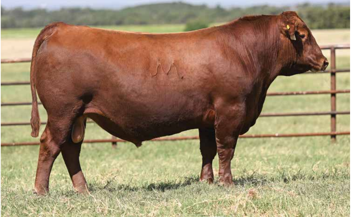
4MC QUARTERBACK 2184