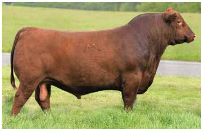
4MC THE COWBOY WAY 970 $25,000 MATERNAL BROTHER TO LOT 8 PURCHASED BY PLEASANT HILL CATTLE COMPANY