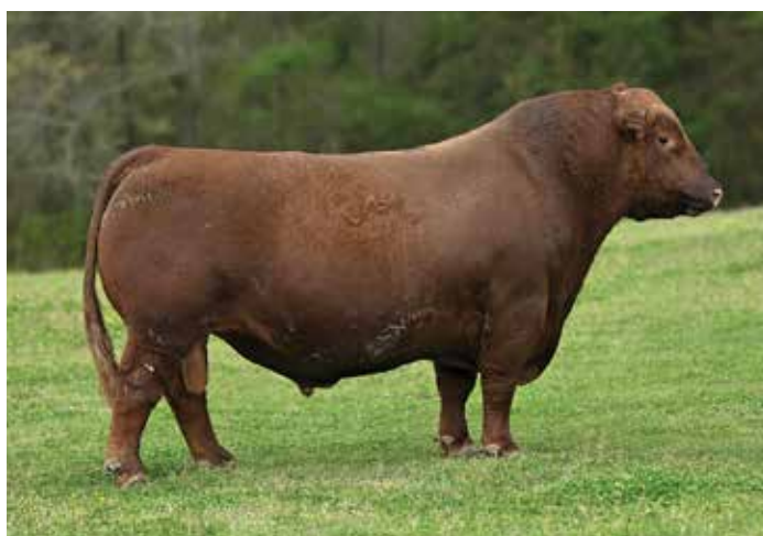
4MC KING OF THE COWBOYS 706 $210,000 VALUATION SIRE OF LOTS 55 & 56