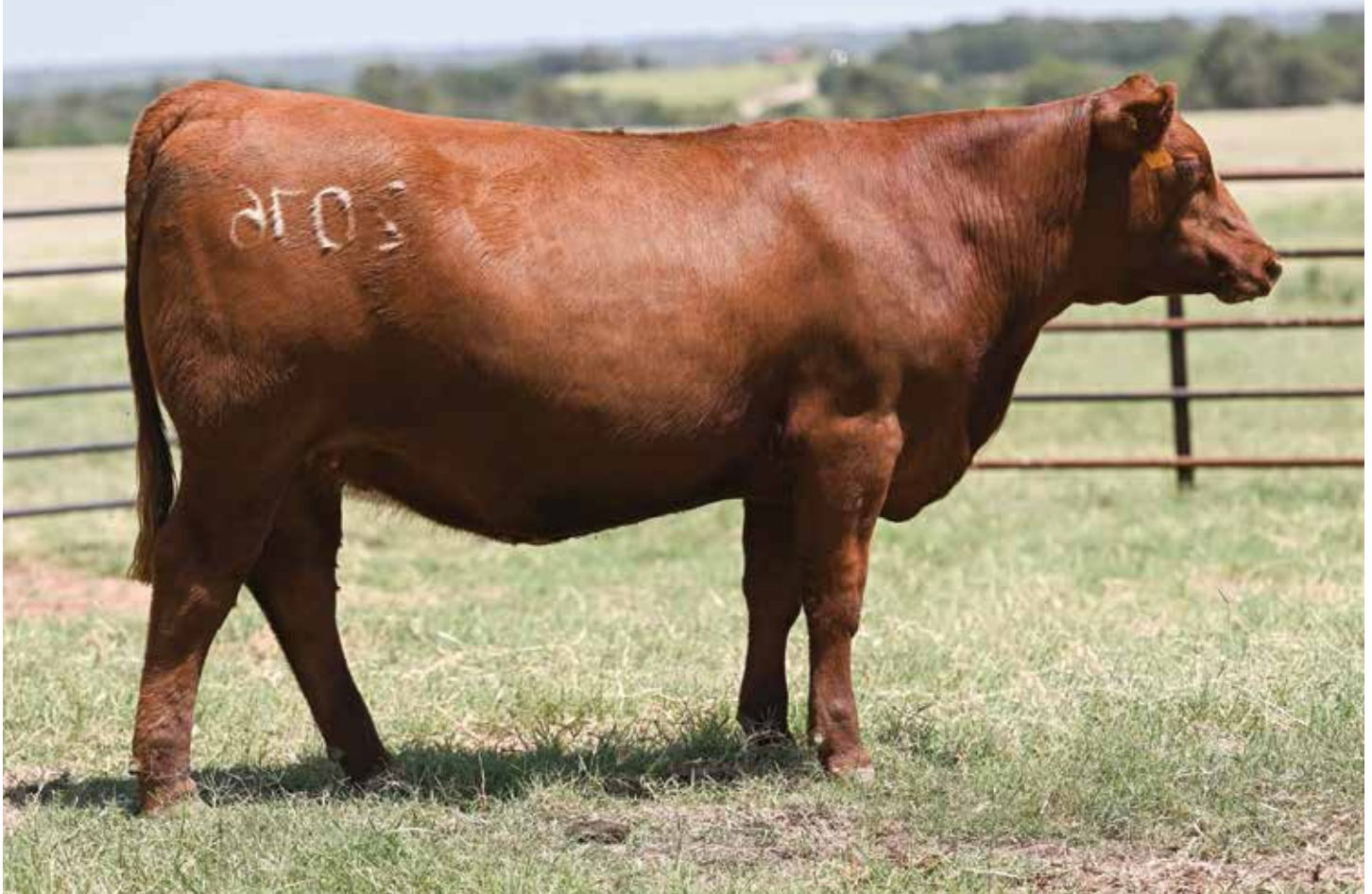
4MC MISS CHERRY 2076