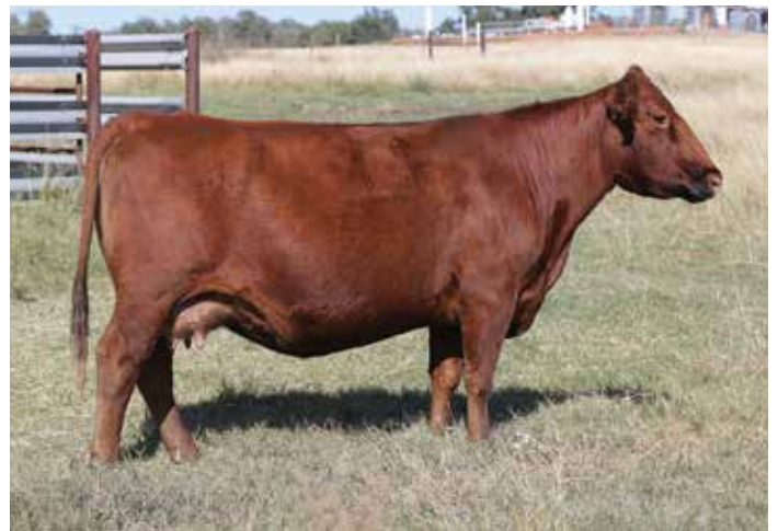
4MC MAKE MIMI 1034 - 3RD GENERATION DAM OF LOT 2