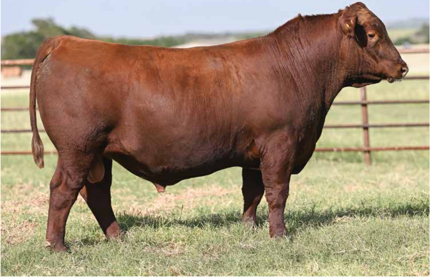
4MC FULLBACK 2221