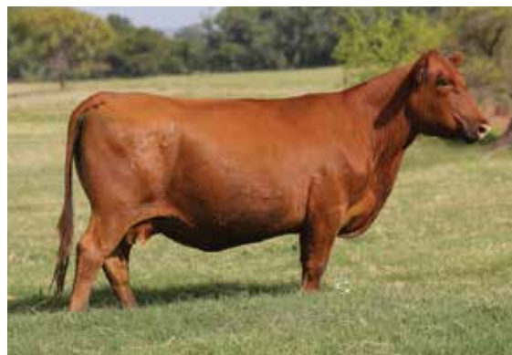
4MC HVYWT 5163