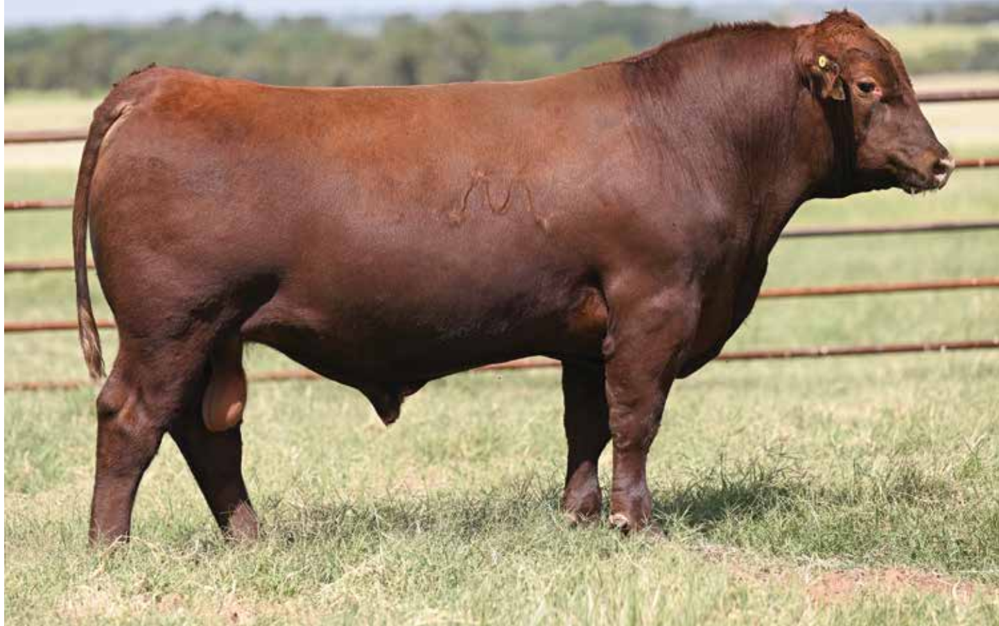
4MC CONVOY 2252