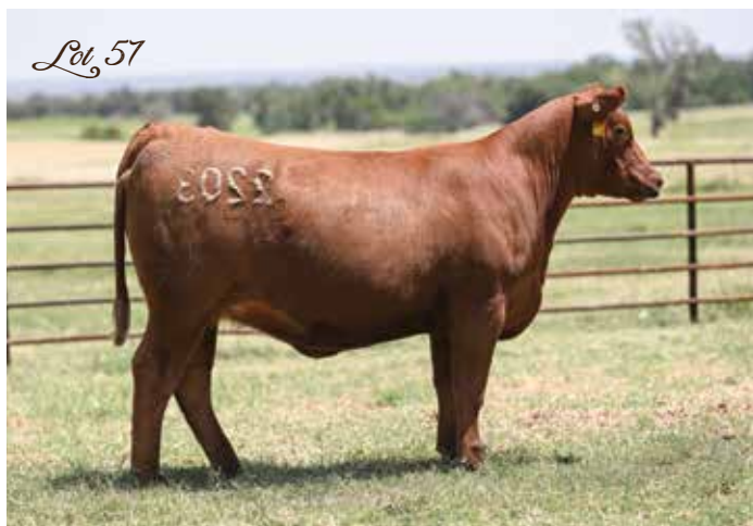
4MC SEREOLA SUE 2203