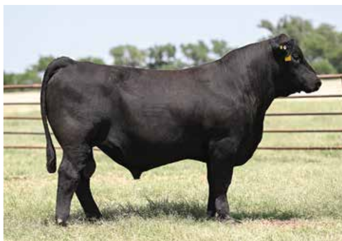
PIE CONFIDENCE 2036 SERVICE SIRE TO SEVERAL FEMALES THROUGHOUT THE OFFERING!