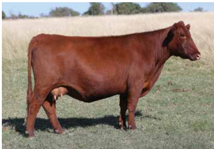
4MC HVYWT 2107 - 3RD GENERATION DAM OF LOT 38