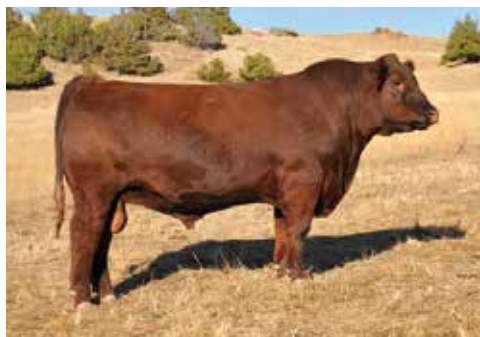
PIE CODE RED 9058 - $50,000 SERVICE SIRE TO LOT 72