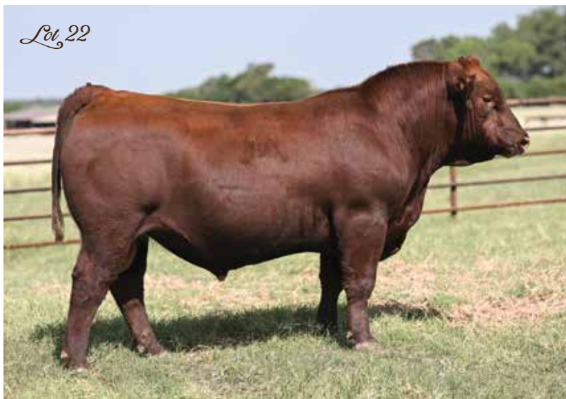
4MC FULLBACK 2145