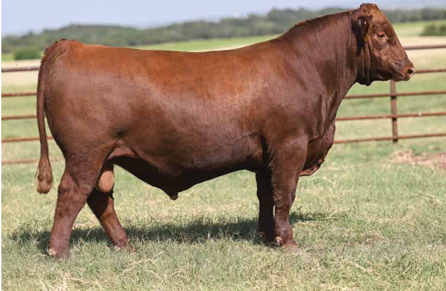
4MC QUARTERBACK 2153