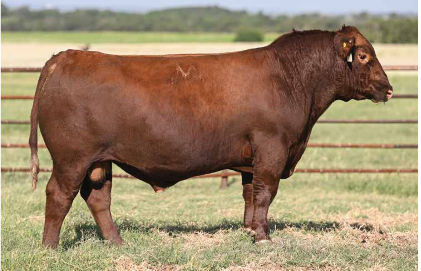
4MC KING OF THE COWBOYS 2014