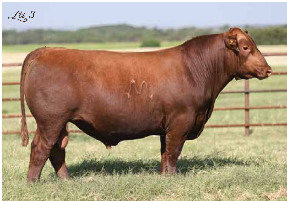
4MC KING OF THE COWBOYS 2115