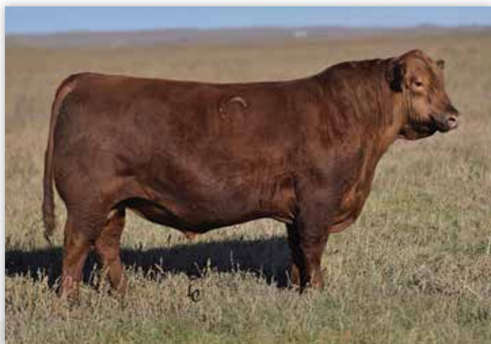
PIE STOCKMAN 4051 - PATERNAL GRANDSIRE OF LOT 99