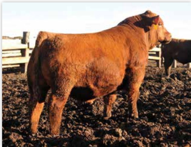
9 MILE BLOCKOUT 7102 - PATERNAL GRANDSIRE OF LOTS 83-89