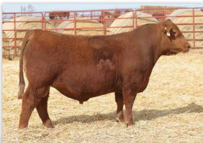
4MC NEW TERRITORY 1177 - FULL BROTHER TO LOT 24