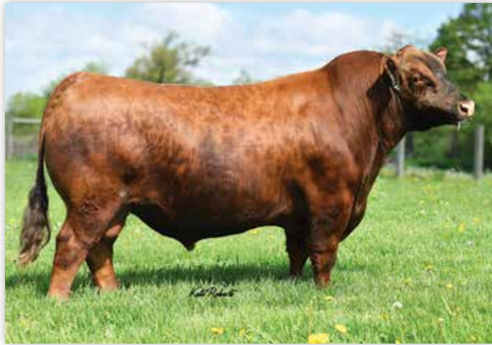
9 MILE FRANCHISE 6305 MATERNAL GRANDSIRE OF LOT 32