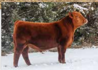
AHL FLASHBACK 446B MATERNAL GRANDSIRE OF LOT 79