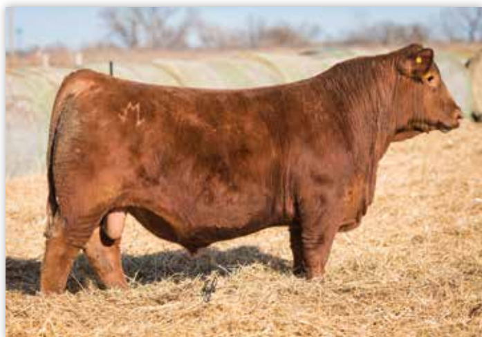
MF RAMBLER 7191 - MATERNAL GRANDSIRE OF LOT 68