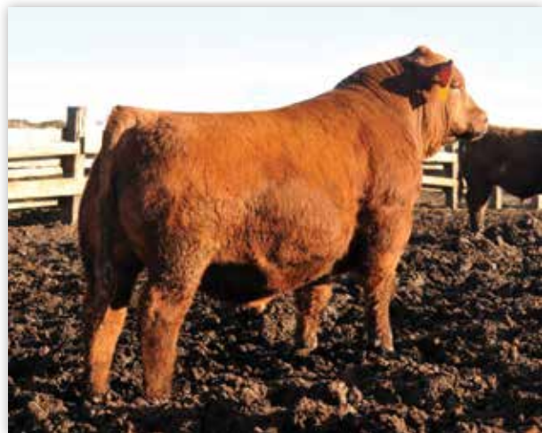
9 MILE BLOCKOUT 7102 - MATERNAL GRANDSIRE OF LOT 67