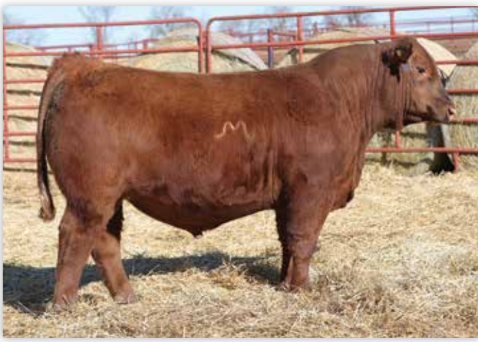
4MC 20M BLOCKOUT 113 - 3/4 BROTHER IN BLOOD TO LOT 5