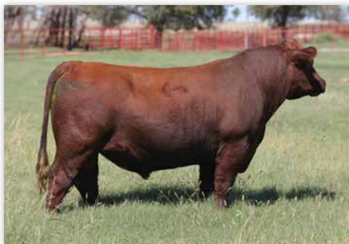
PIE NEW TERRITORY 523 - SIRE OF LOTS 23-25