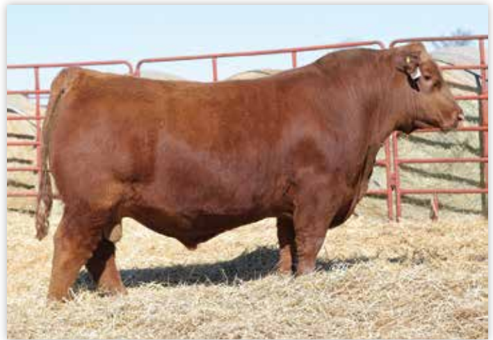
4MC STRONG SIDE 0403 OUT OF A MATERNAL SISTER TO DAM OF LOT 37