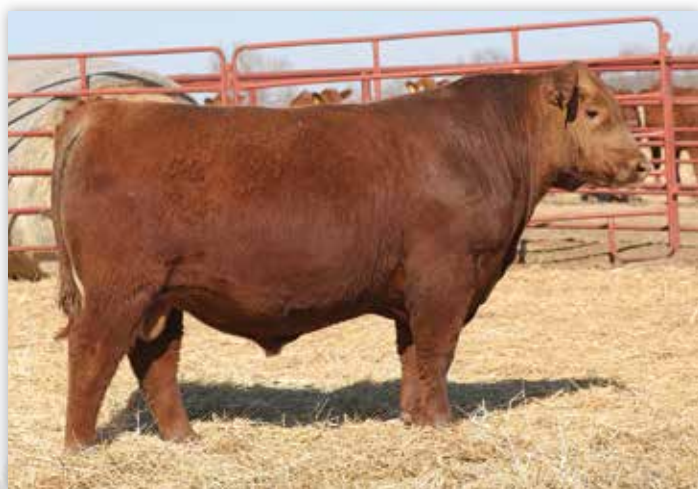
4MC WEIGH UP 0390 - PRODUCT OF THE "KARUBA 7316" COW FAMILY!