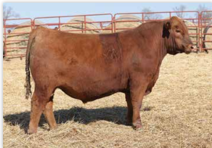
4MC BLOCKOUT 0389 - MATERNAL BROTHER TO LOT 31