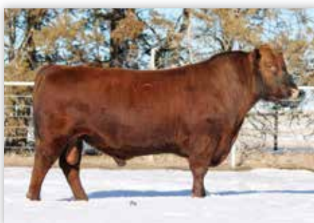
RED LAZY MC REDMAN 20X MATERNAL GRANDSIRE OF LOT 42