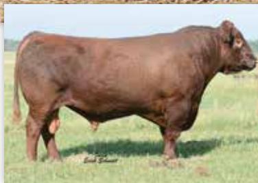
LSF SAGA 1040Y MATERNAL GRANDSIRE OF LOT 1