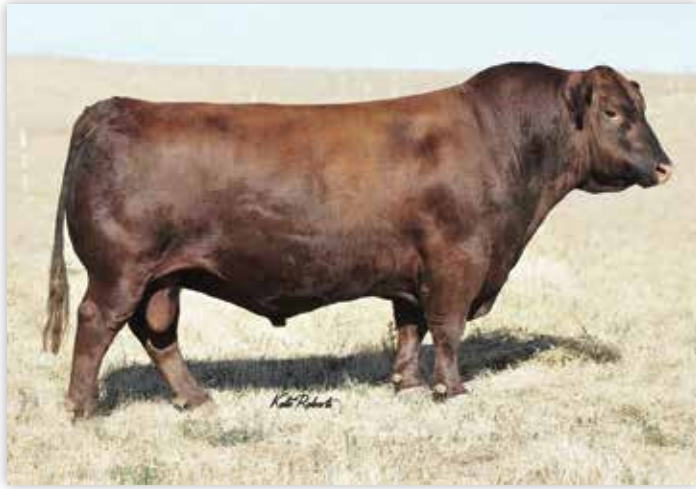
ANDRAS FUSION R236 - PATERNAL GRANDSIRE OF LOTS 92-98