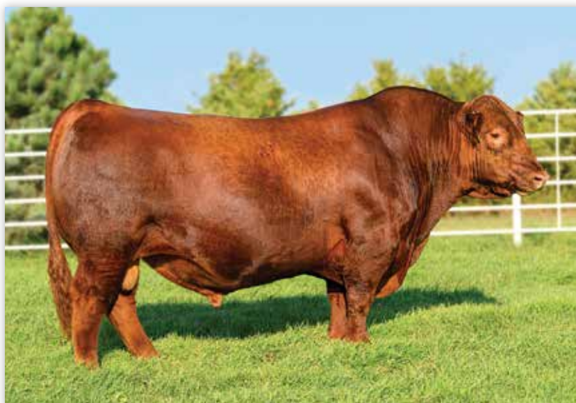
PIE QUARTERBACK 789 - SIRE OF LOT 99