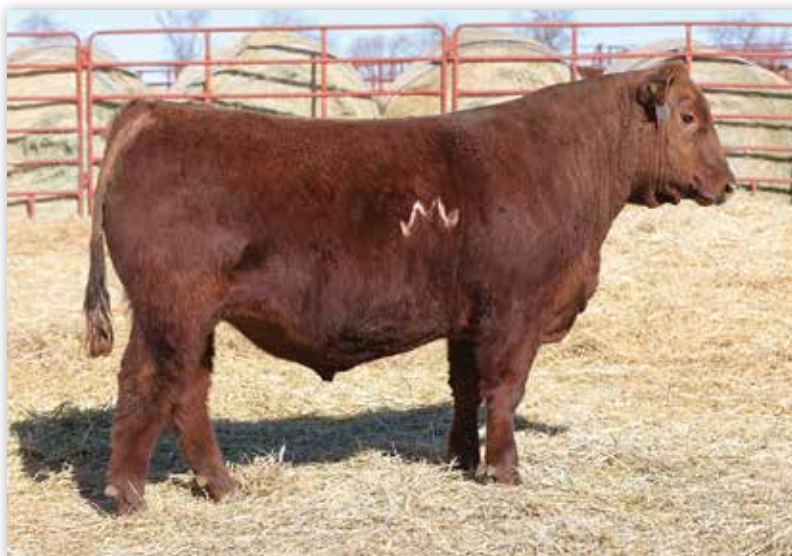
4MC NEW TERRITORY 1174 - 3/4 SIB IN BLOOD TO LOT 120