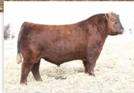
PIE FULLBACK 7005 - PATERNAL GRANDSIRE OF LOTS 81 & 82