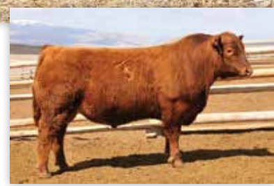
5L BLOCKADE 2218-30B PATERNAL GRANDSIRE OF LOTS 1 & 2