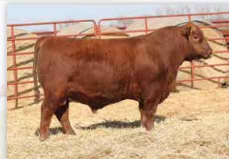
4MC BLOCKOUT 0407 MATERNAL BROTHER TO LOT 42