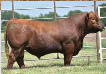
BYU FULLBACK 9338 ET - SIRE OF LOTS 81 & 82