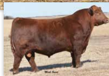
PIE THE COWBOY KIND 343 PATERNAL GRANDSIRE OF LOTS 79 & 80