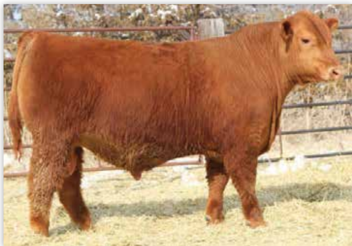
PIE WEIGH UP 8157 - SIRE OF LOTS 100 - 104