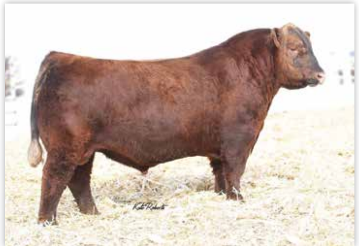
PIE FULLBACK 7005 - PATERNAL GRANDSIRE OF LOTS 29-42