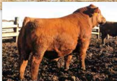
9 MILE BLOCKOUT 7102 SIRE OF LOTS 1 & 2