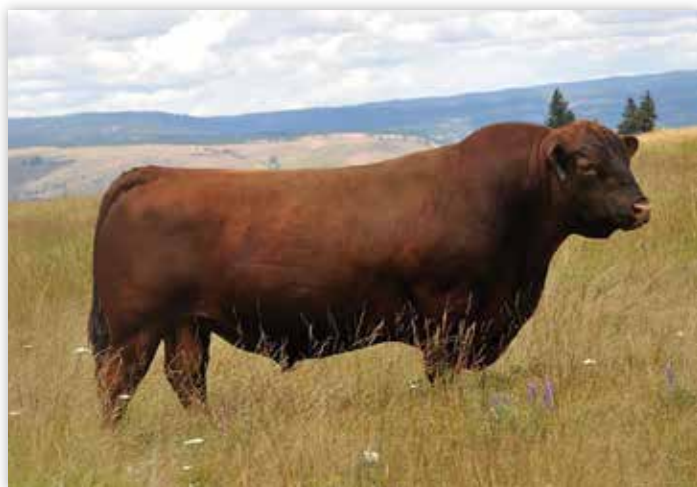
RREDS SENECA 731C - PATERNAL GRANDSIRE OF LOTS 124-126