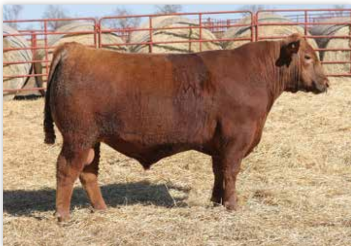
4MC WEIGH UP 0391 - MATERNAL BROTHER TO LOT 39