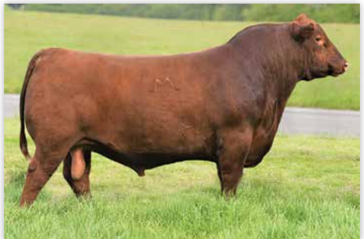
4MC THE COWBOY WAY 970 - SIRE OF LOTS 51 & 52