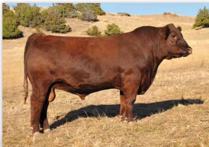
PIE CODE RED 9058 - MATERNAL GRANDSIRE OF LOT 59