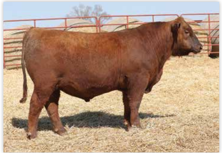
4MC NEW TERRITORY 1189 - 3/4 SIB IN BLOOD TO LOT 118