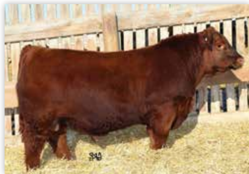
RED U-2 RENOWN 193C - MATERNAL GRANDSIRE OF LOT 43