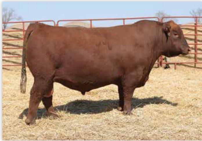
4MC BLOCKOUT 0275 - MATERNAL BROTHER TO LOT 117