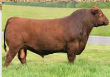
4MC THE COWBOY WAY 970 SIRE OF LOTS 79 & 80