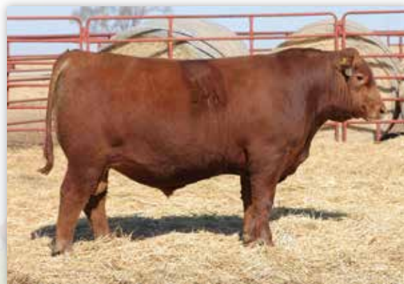
4MC WEIGH UP 0402 - MATERNAL BROTHER TO LOT 29