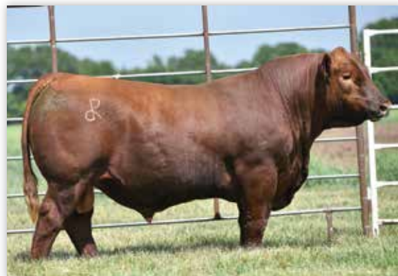
BYU FULLBACK 9338 ET - SIRE OF LOTS 29-42