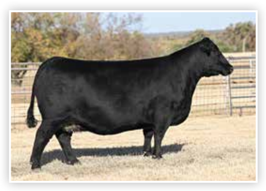
HILB CAUGHT LOOKIN B929 Maternal Granddam of Lot 22