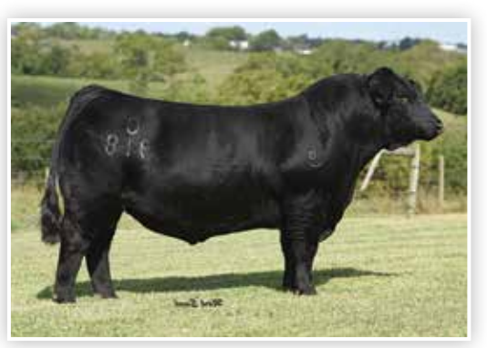
ROCKING P LEGENDARY C918 Sire of Lot 21