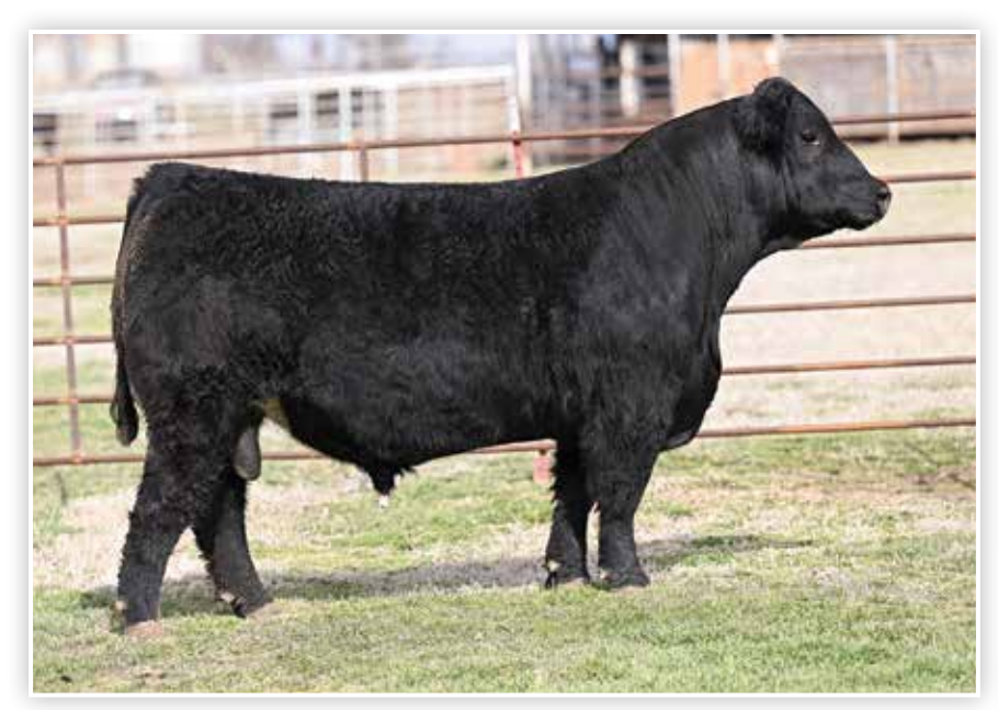
Lot 30 B C R RECKONING 047J