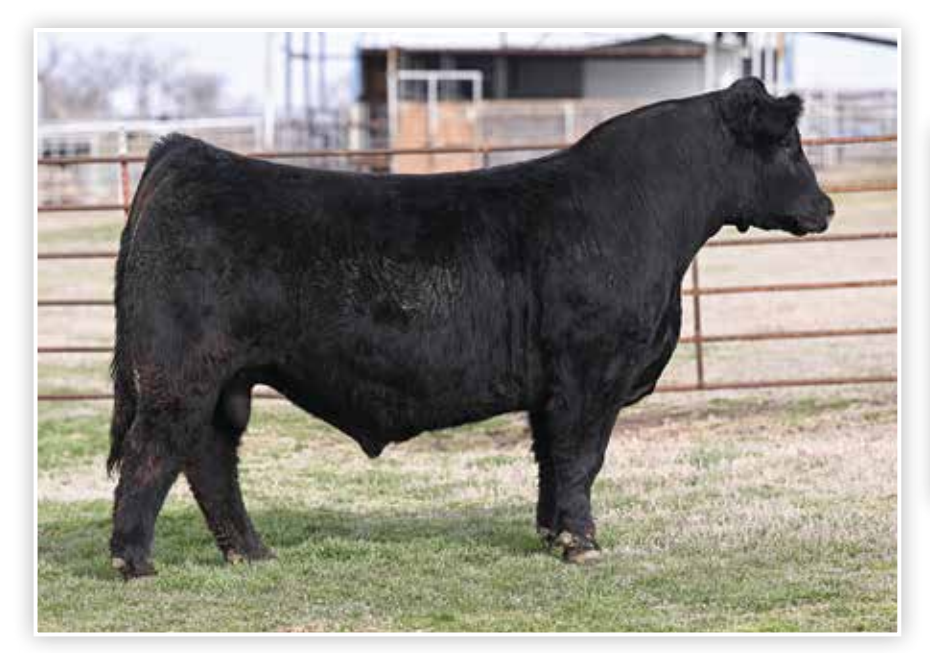
Lot 25 B C R COPACETIC J152