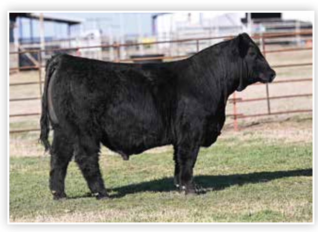
Lot 14 B C R GIDEON J243