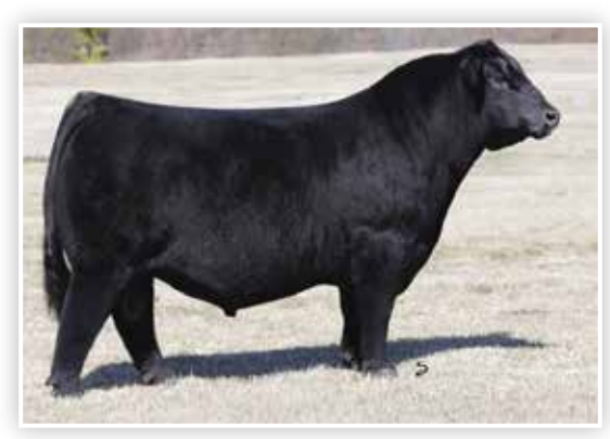
CONLEY EXPRESS 7211 Sire of Lots 36 & 37