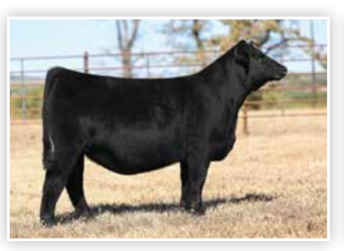
BCR DREAM BIG 002K Full Sister to Lot 4