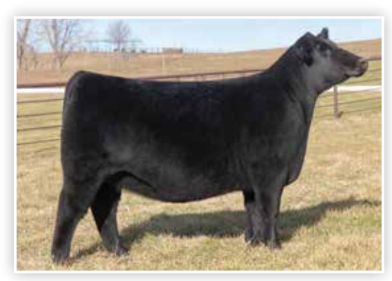
HENNING BCII SANDY 8070 Dam of Lots 36 & 37