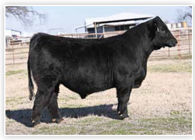
Lot 10 B C R PAYS TO BELIEVE J228