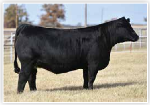
B C R HOPE F306 Full Sister to Dam of Lot 24