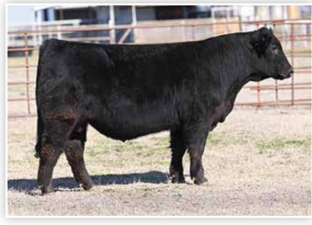
Lot 9 B C R PERFECT VISION J247