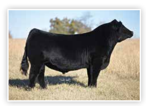
LLSF PAYS TO BELIEVE ZU194 Sire of Lots 10 & 11