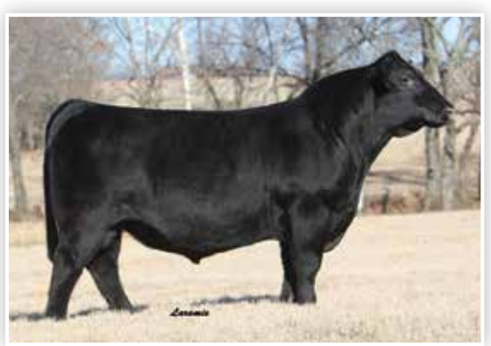
WLE COPACETIC EO2 Sire of Lots 25 & 26