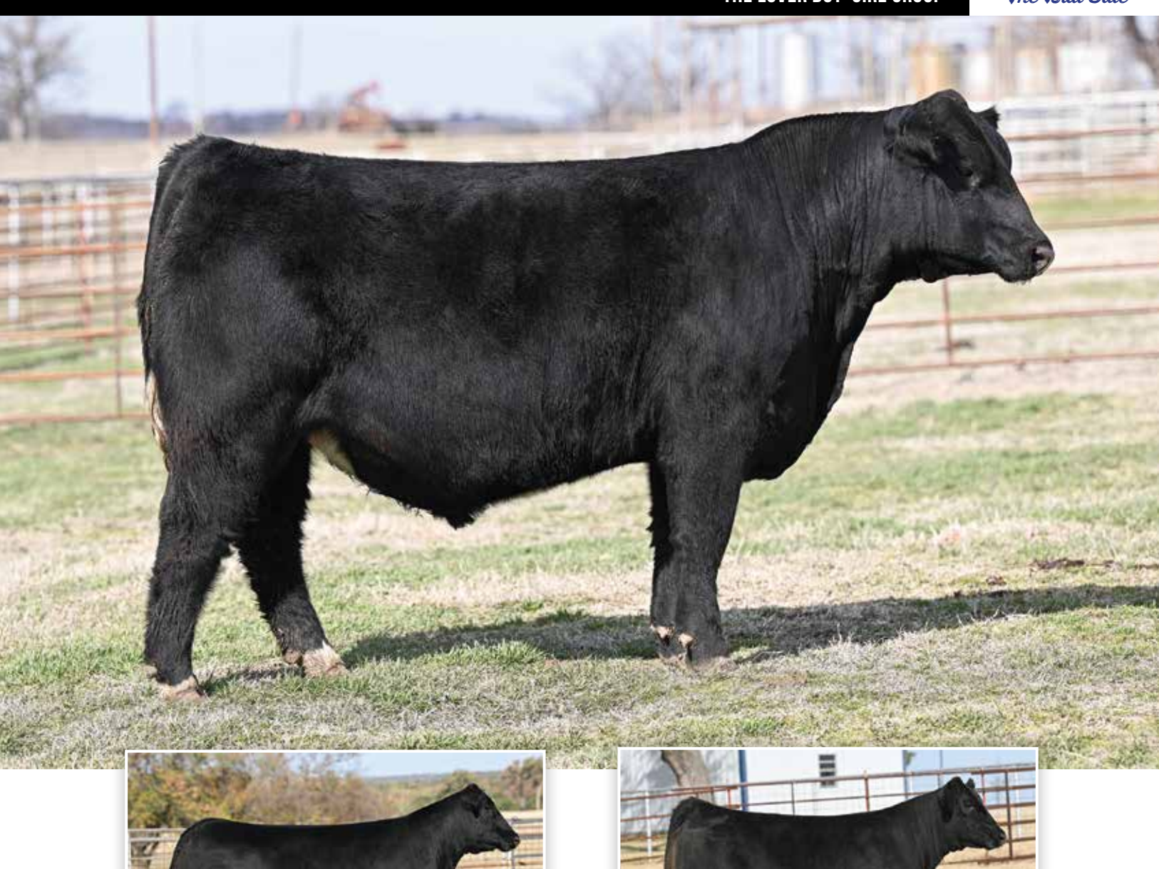
HILB CAUGHT LOOKIN B929 Three-Quarter Sister to Dam of Lot 2