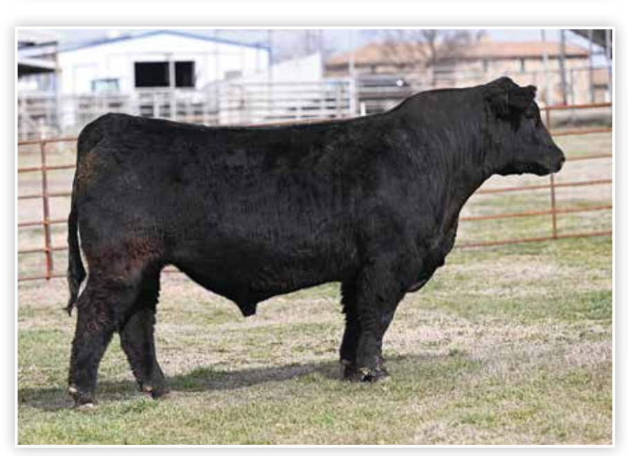
Lot 35 B C R PROFIT 083J