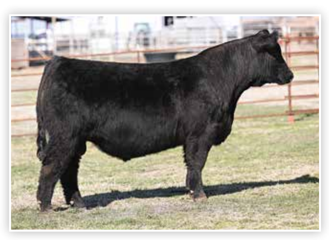
Lot 8 B C R PERFECT VISION 020K