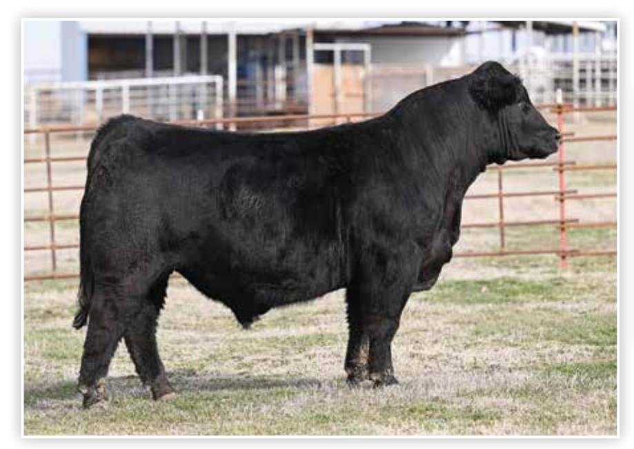
Lot 34 B C R RECKONING J043