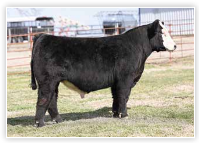
Lot 11 B C R PAYS TO BELIEVE 013K