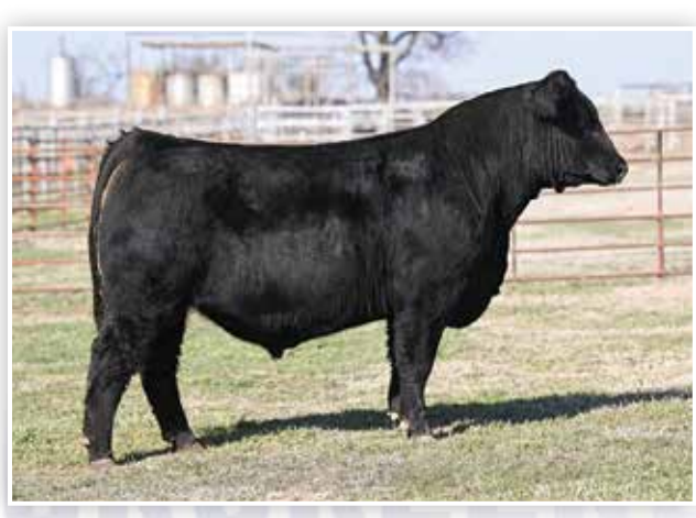
Lot 12 GCLD PAYS TO DREAM J221