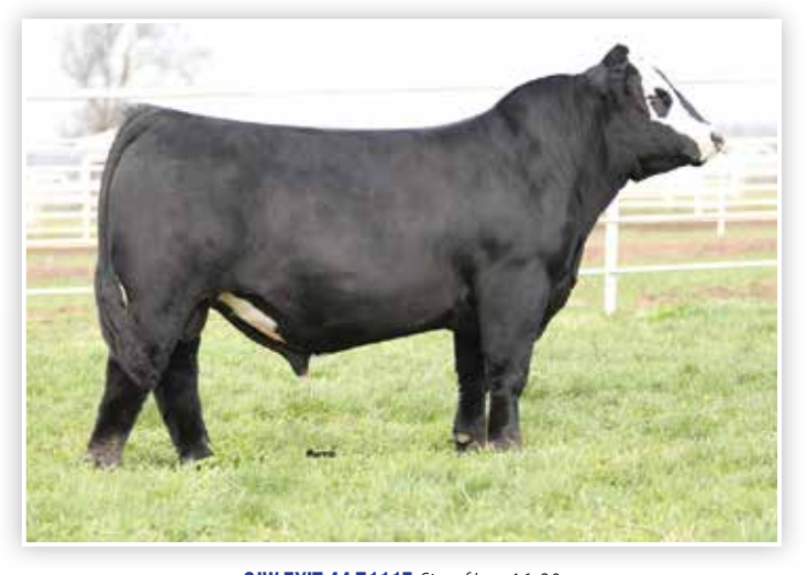
SJW EXIT 44 7111E Sire of Lots 16–20