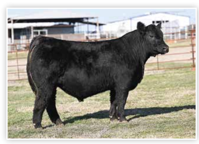
Lot 13 B C R GIDEON J259