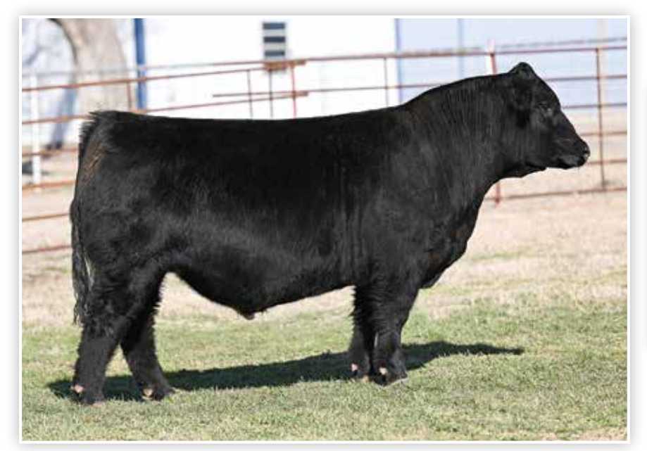
Lot 5 B C R 20-20 J201