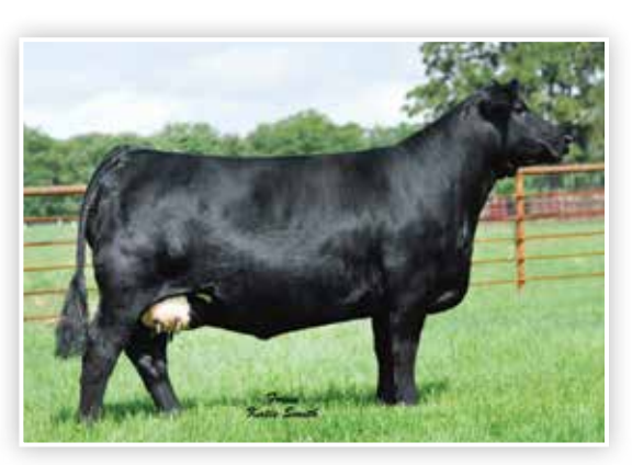
RP/MP BUILT TO LOVE A021 Dam of Lot 30 & 31