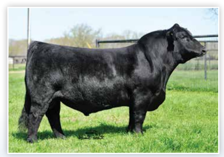
HPF QUANTUM LEAP Z952 Sire of Lots 27–29