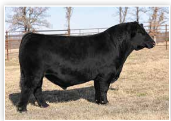
RP/BC EMINENCE HOO5 Maternal Brother to Lots 30 & 31