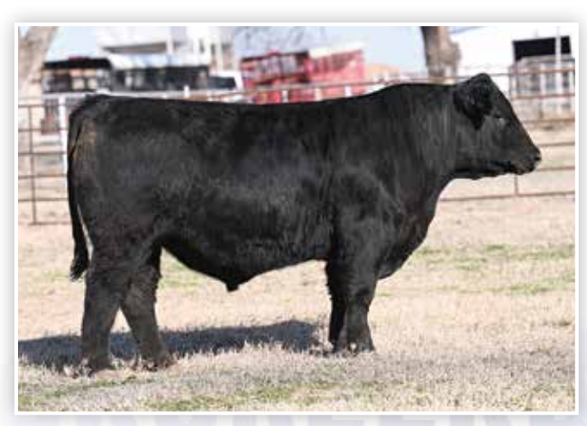
Lot 15 B C R GIDEON J217