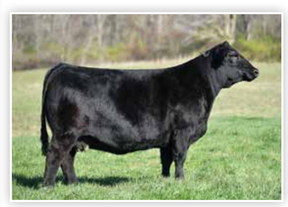
MISS TIME TO SHINE Y251 Dam of Lots 5 & 6