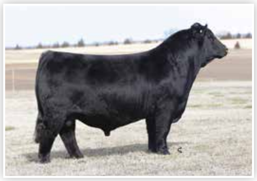
FITZ GIDEON 802F Sire of Lot 22