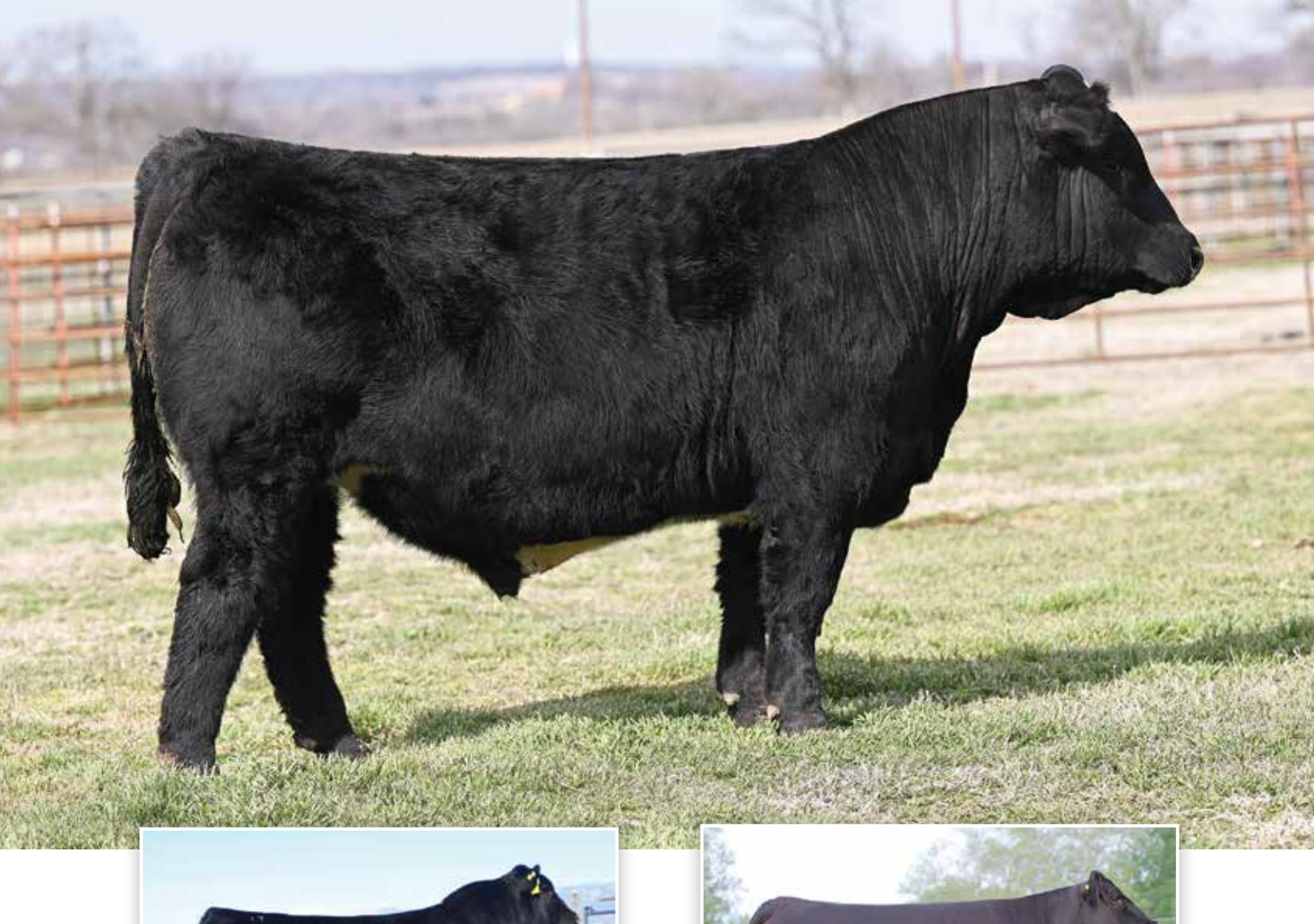
THSF LOVER BOY B33 Sire of Lots 1 & 2