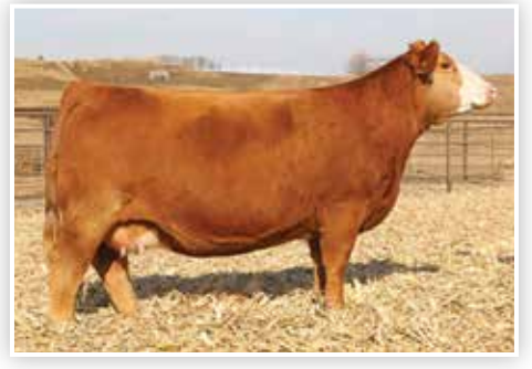
SVJ SHE'S THE DREAM B796 Maternal Granddam of Lot 4