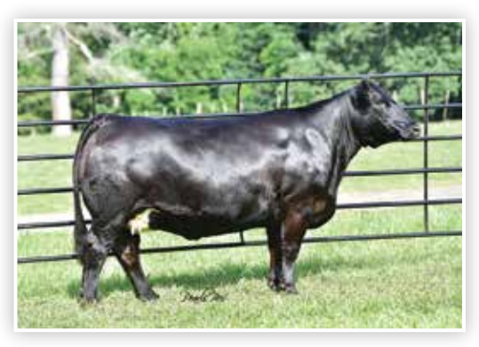
TNGL HOPES DESIGN A589 Maternal Granddam of Lot 24