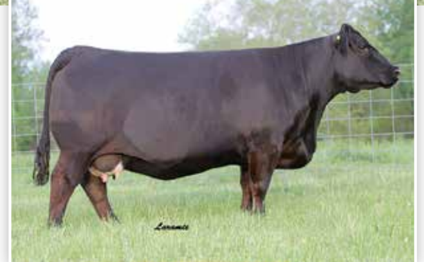
STF ONYX 451W Maternal Granddam of Lot 1