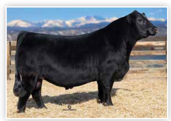
RECKONING 711F Sire of Lots 30-34