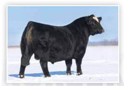
BCR PERFECT VISION Sire of Lots 8 & 9