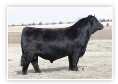
FITZ GIDEON 802F Sire of Lots 13-15