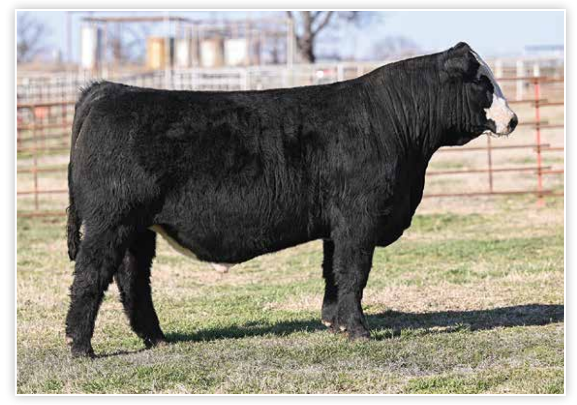
Lot 3 B C R BIG LAR J227