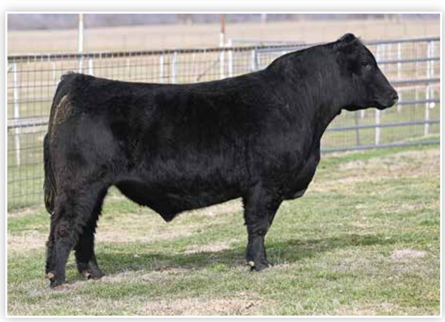
Lot 26 B C R COPACETIC JO11