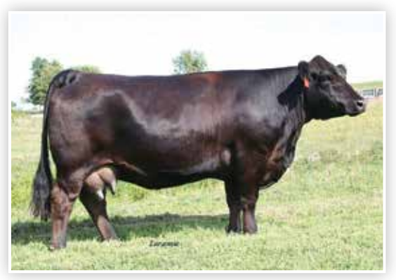
GCF MISS CALIENTE Maternal Granddam of Lot 26