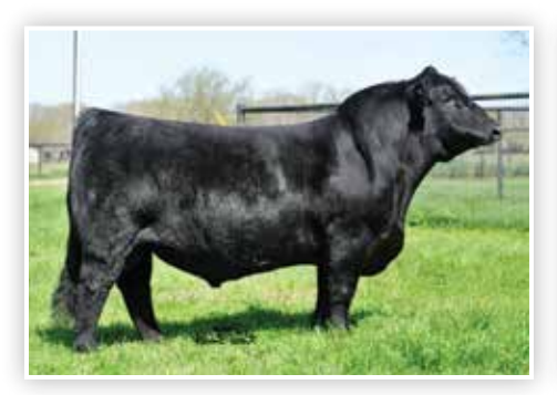
HPF QUANTUM LEAP Z952 Sire of Lot 4