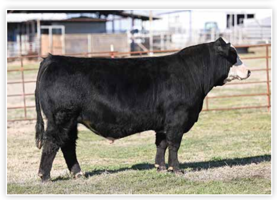
Lot 6 B C R 20-20 J210