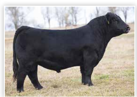
PROFIT Sire of Lot 35