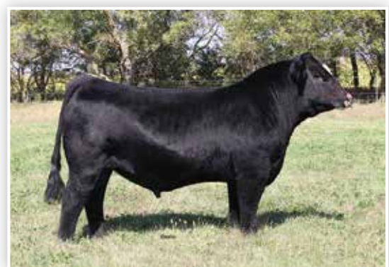
MR CCF 20-20 Sire of Lots 5 & 6