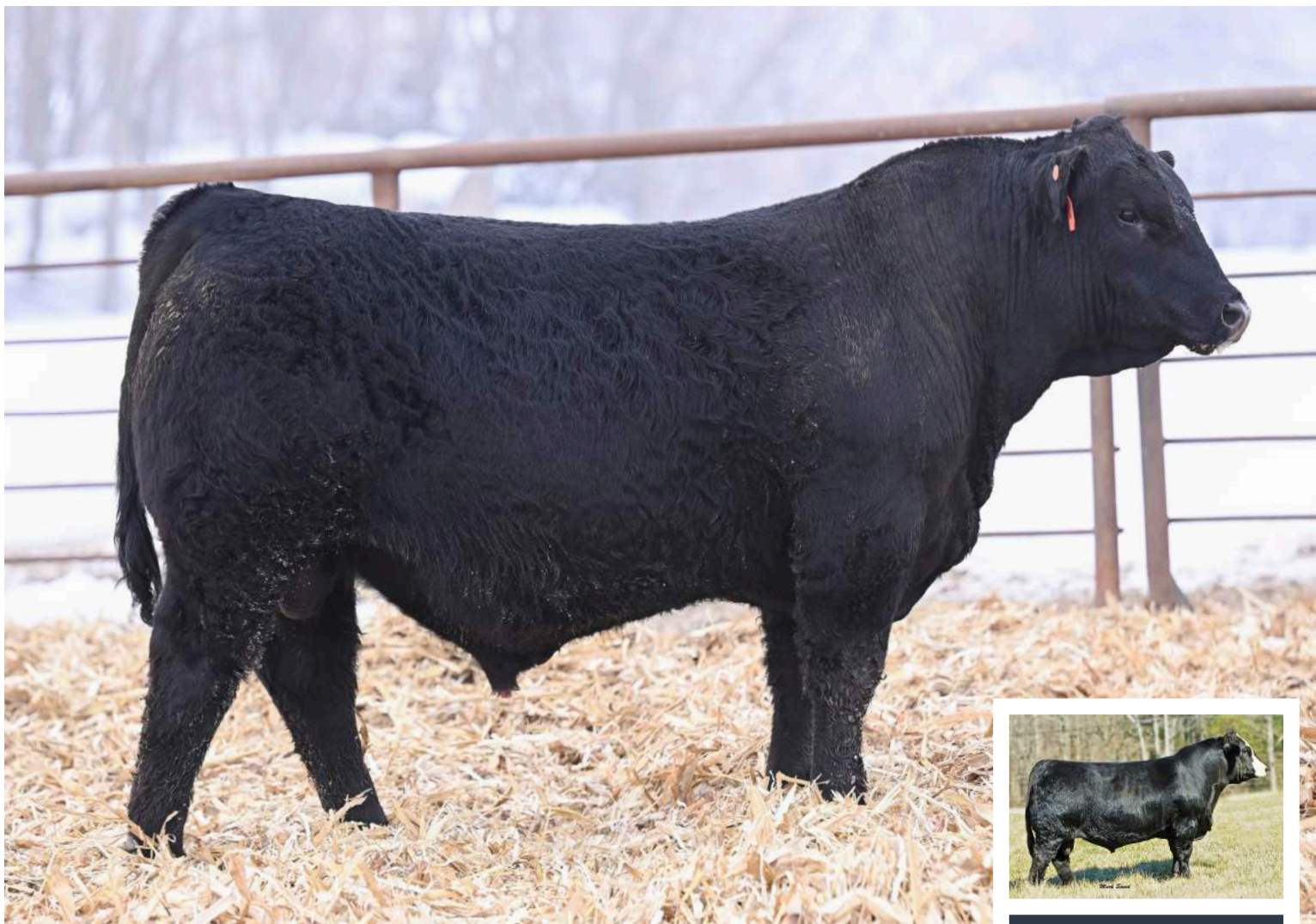
SVF ALLEGIANCE Y802 SIRE OF LOT 12