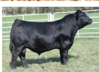
WS PROCLAMATION E202 SIRE OF LOT 9