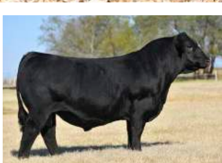
ES RIGHT TIME FA110-4 SIRE OF LOT 1-3