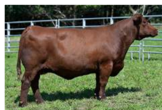
EKHCC RED JEWEL 760 DAM OF LOTS 29 & 30