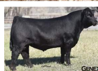
CDI MAINLINE 265D SIRE OF LOTS 15-19