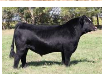
MR CCF 20-20 SIRE OF LOT 4