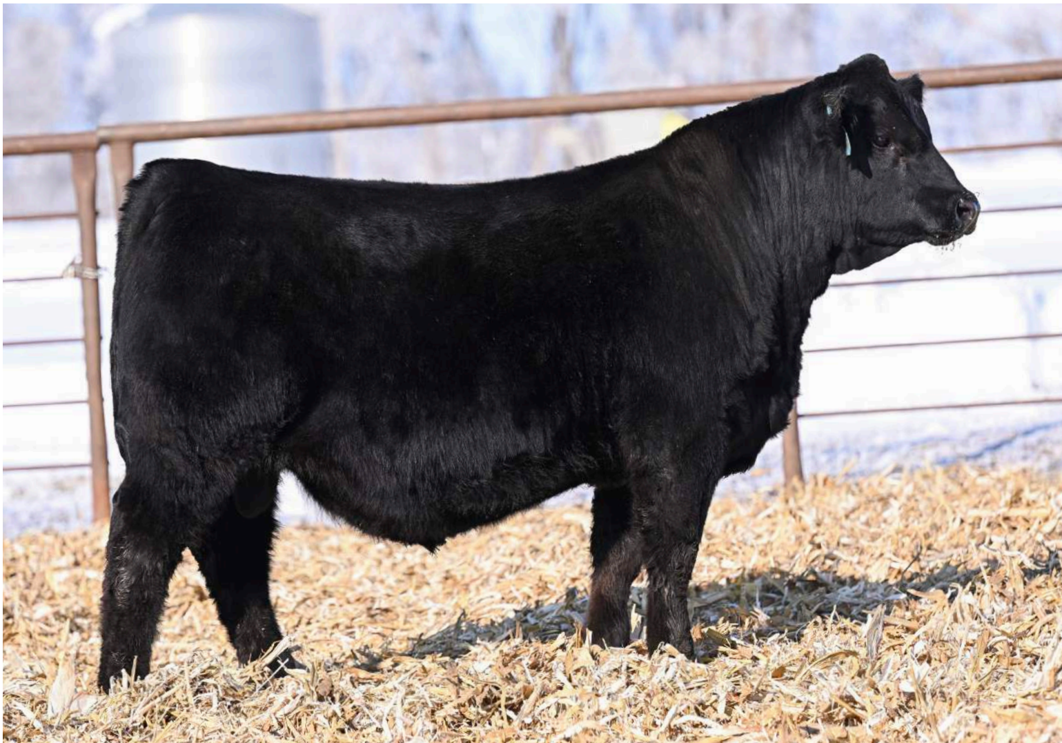
OWNED BY LOUWERSE CATTLE COMPANY