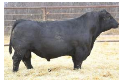
TJ MAIN EVENT 503B SIRE OF LOT 13 & 14

We lost TJ Main Event 503B this past year. His influence will remain everlasting on the beef industry. He was perfect footed, easy fleshing, and offered tremendous docility. Over 4700 progeny have been recorded with the American Simmental Association!