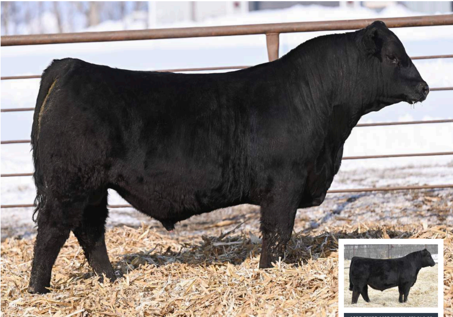
LCDR FAVOR 149F SIRE OF LOTS 21 & 22