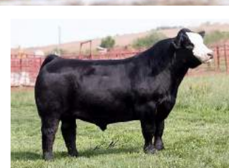
REMINGTONSECRETWEAPON185 SIRE OF LOT 5 & 6