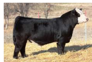
W/C LOADED UP 1119Y SIRE OF LOT 30