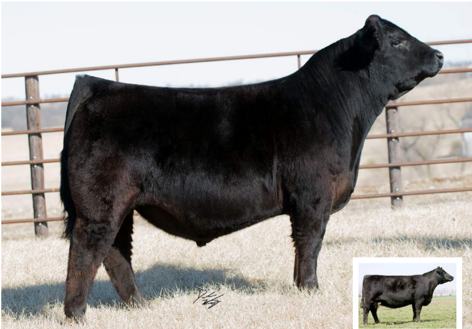
WRS EMERGENT E715 SIRE OF LOT 23