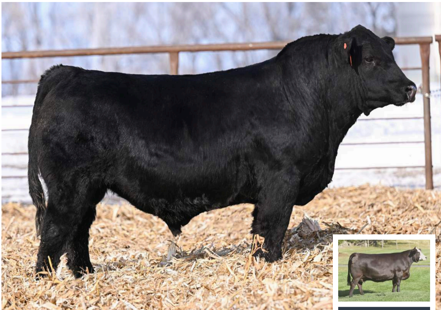
HPF MISTI U353 DAM OF LOT 13 & 14