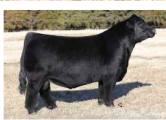
JSUL SOMETHING ABOUT MARY 8421 SIRE OF LOT 26