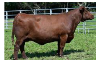
EKHCC RED JEWEL 760 DAM OF LOT 6