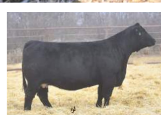
WS MISS SUGAR C4 DAM OF LOTS 1 & 2