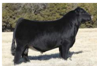
GEFF COUNTY O SIRE OF LOT 29