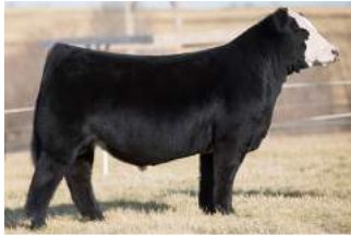
JASS ON THE MARK 69D SIRE OF LOT 11