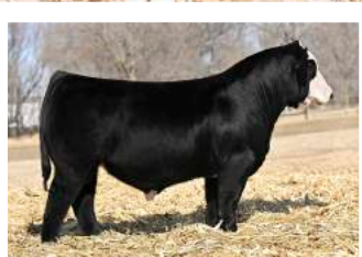
W/C BANK ON IT 273H SIRE OF LOT 28