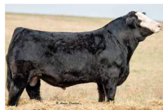
SSC SHELL SHOCKED 44B FULL BROTHER TO LOT 5