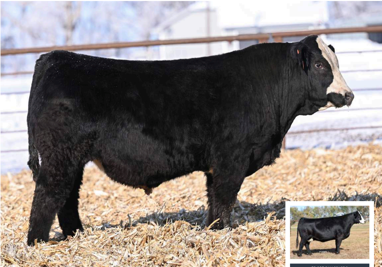
ES A85 DAM OF LOT 3