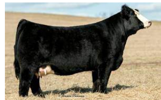
SSC VICTORIA'S SECRET 49B FULL SISTER TO LOT 5