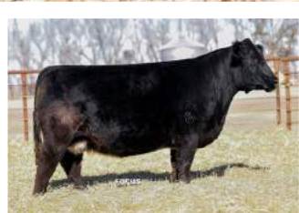
B&K QUEEN SUPREME 28B DAM OF LOT 28