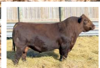
CDI PERSPECTIVE 238A SIRE OF LOT 8