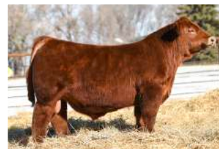
SS FORT HAYES H618 SIRE OF LOT 27