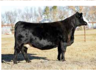
HF CORA 58C DAM OF LOT 26