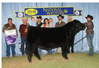
THSF LOVER BOY B33 SIRE OF LOT 7