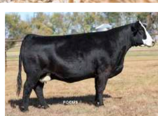
ES A85 DAM OF LOT 27