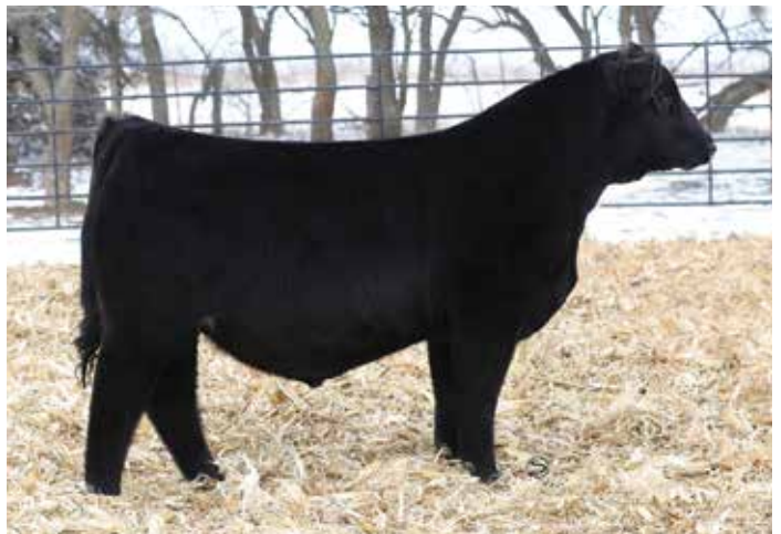
SJF UNDER OATH | Sire of Lot 48