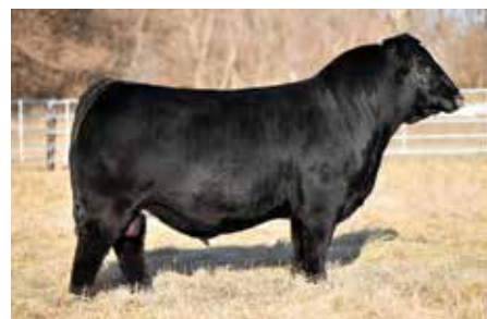
JBSF BERWICK 41F Sire of Lots 109 & 110