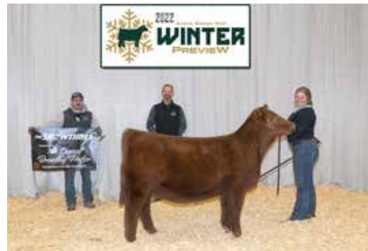
SJF CHARLIE | 2022 NE AGR 7th Overall Breeding Heifer & Maternal Sister to Lot 101