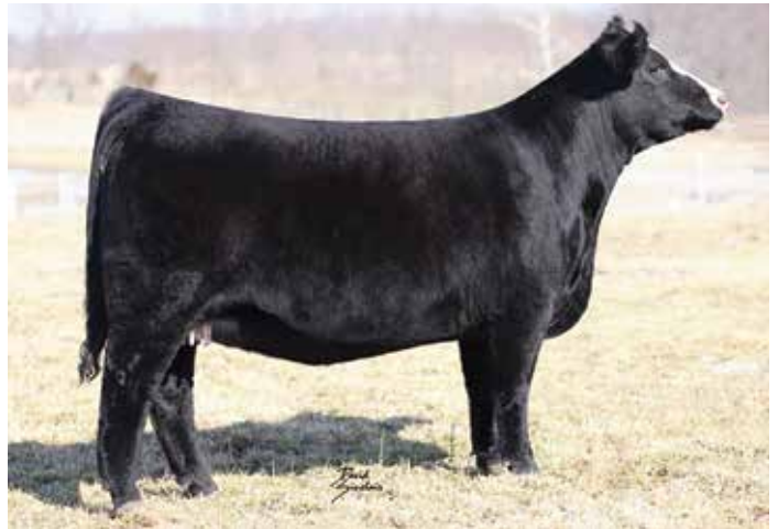
MISS USA | Maternal Granddam of Lot 104