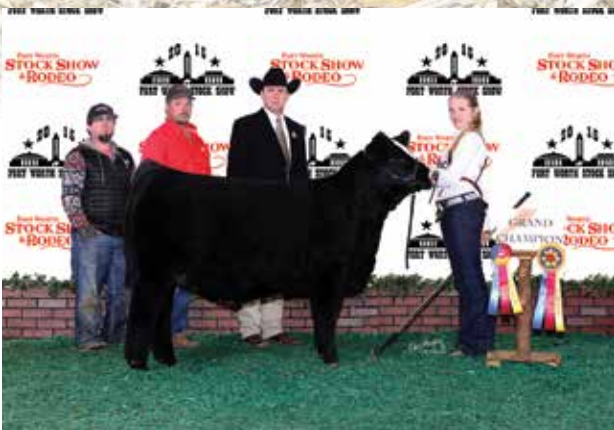
BAR O BRETТА

2015 FWSS Grand Champion Purebred Simmental Heifer & Maternal Sister to Lot 34