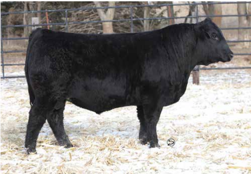
LOT 21 | 4/B MR REMEDY 22K