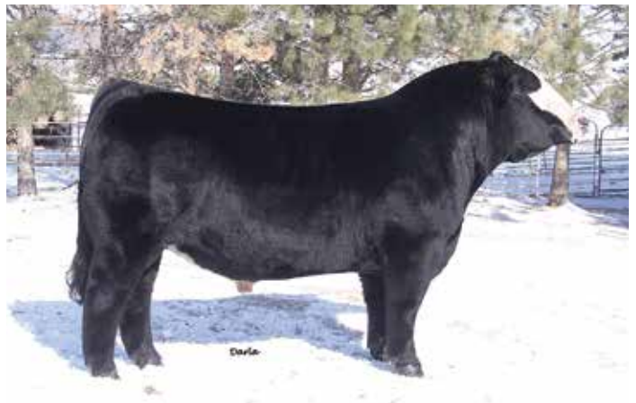
MR HOC BROKER | Sire of Lots 102 & 103