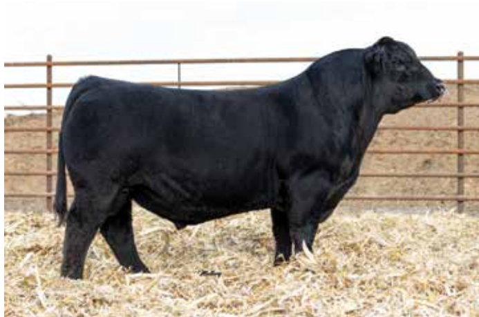
OMF EPIC E27 | Service Sire to Lots 105 & 106

Confirmed safe in calf to OMF Epic E27 (ASA 3317371) due 2/27/23.