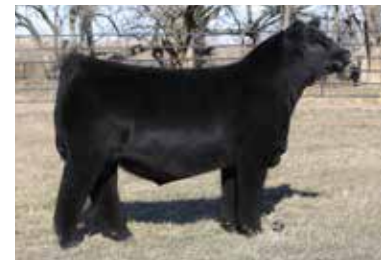
STCC TECUMSEH 058J $620,000 Maternal Brother to Dam of Lot 50