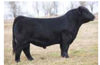
PROFIT (deceased) $400,000 Maternal Brother to Lot 11