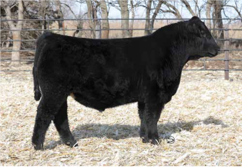
LOT 26 | HCCO REMEDY 715K