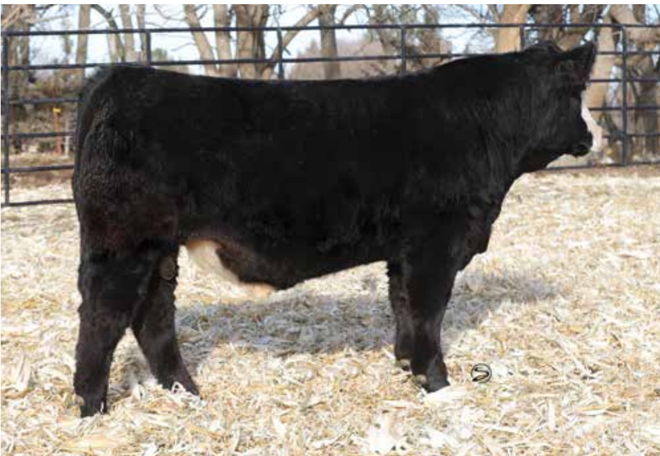
LOT 43 | MGI FORTUNE 218K