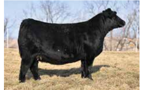
EC COUNTESS 289F Maternal Sister to Lot 20