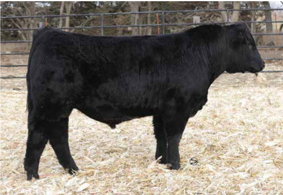
LOT 23 | 4/B MR REMEDY 121K