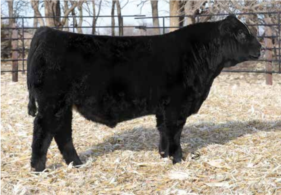
LOT 37 | PRIME 227K