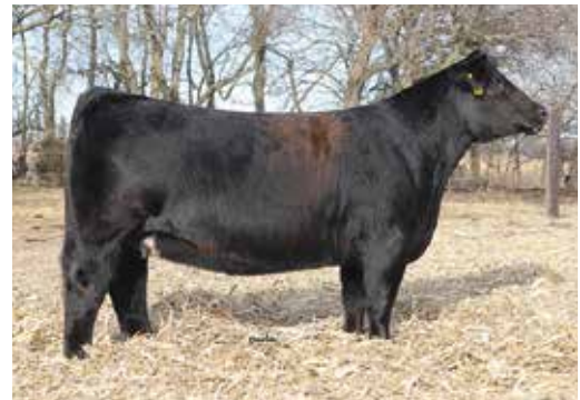
WAGR PANARAMA 204Z | Dam of Lot 11