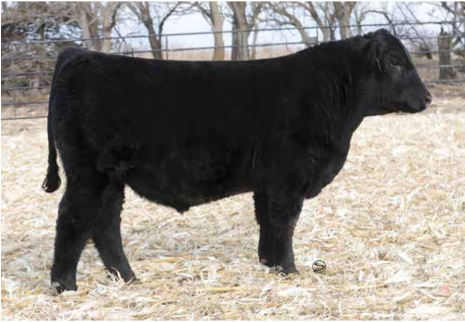
LOT 18 | MR CARDINAL 17K