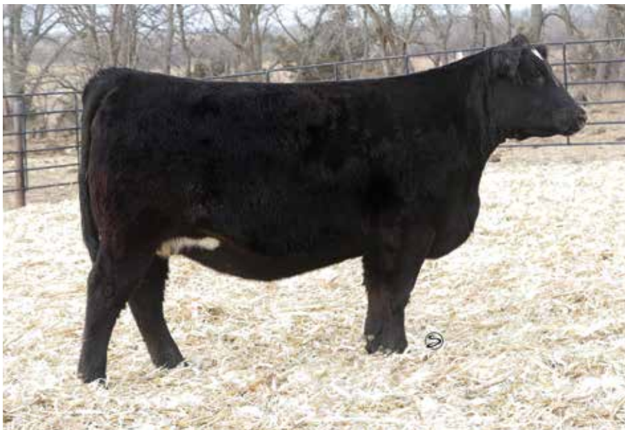
LOT 109 | SJF JULIA