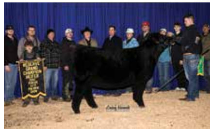
2022 PURDUE AGR RESERVE SUPREME CHAMPION HEIFER $90,000 Maternal Sister to Lot 7