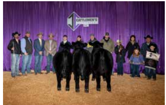
2022 Cattlemen's Congress Grand Champion Pen of Three Purebred Simmental Bulls