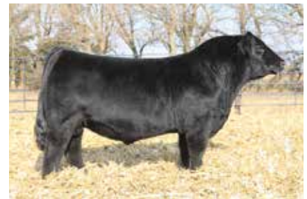
EC REBEL 156F | Sire of Lot 36