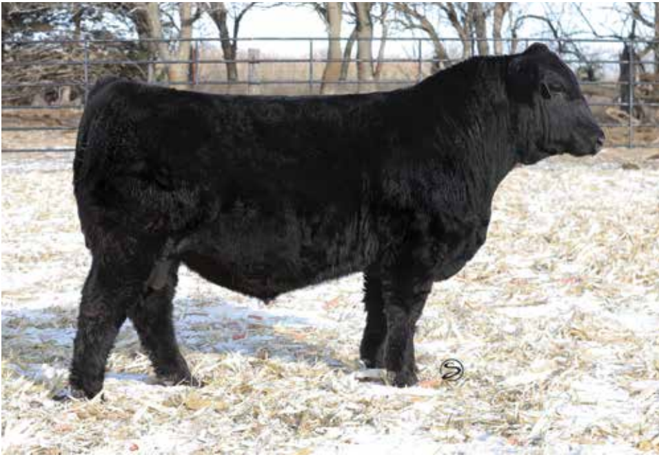
LOT 20 | EC REMEDY 289K