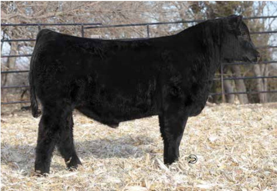
LOT 35 | MAHONEY'S PROFIT 205K