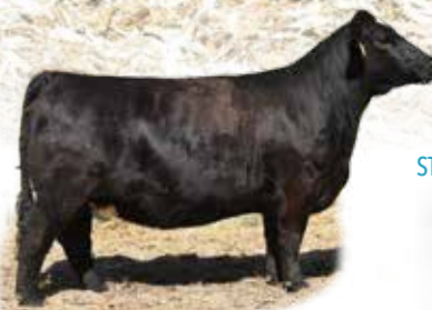
STN MISS STAR LIGHT Dam of Lot 7