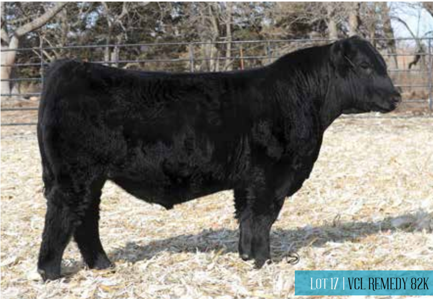
LOT 17 | VCL REMEDY 82K