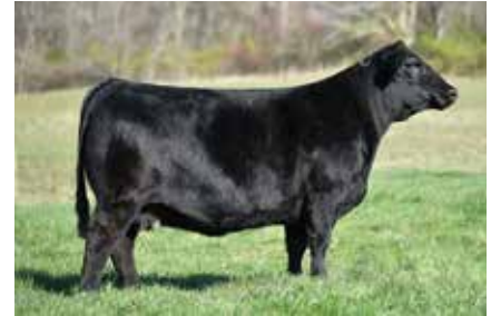
MISS TIME TO SHINE Y251 Maternal Granddam of Lot 32