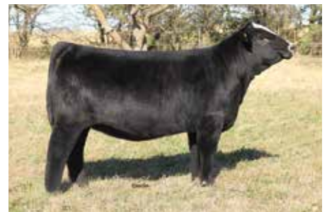
ACLK SHANNON 385C $70,000 Maternal Granddam of Lot 19