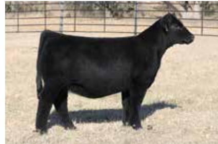
VCL COUNTESS OF 253 16K $45,000 Full Sister to Lots 16 & 17