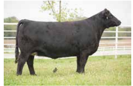
STEWART KATIE 110Z Maternal Granddam of Lot 44