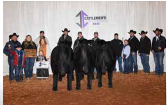
2021 Cattlemen's Congress Grand Champion Pen of Three Purebred Simmental Bulls