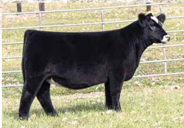
ROXI'S KUTHROAT | $400,000 Full Sister to Lot 46