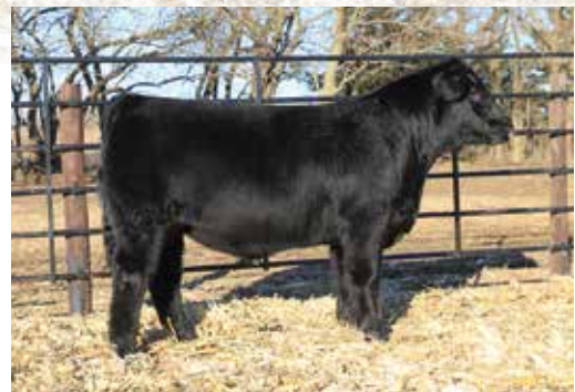
GPG LEGEND 109F | Sire of Lot 39