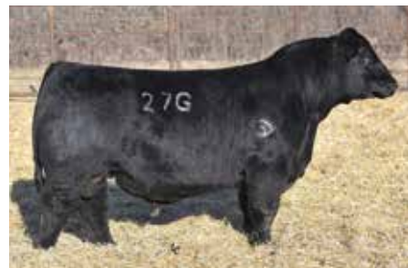
SCHOOLEY STANDOUT Service Sire to Lots 109 & 110