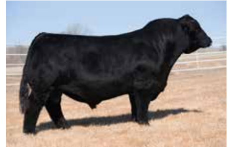
TL LEDGER $250,000 Full Brother to Dam of Lot 18