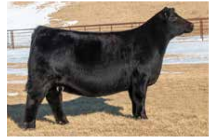
BAILEY'S PROFIT'S DREAM $195,000 Maternal Sister to Lot 24