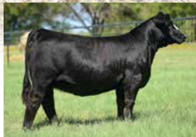
BAR O BONITA | Maternal Sister to Lot 34

2015 FWSS Grand Champion Purebred Simmental Heifer & Maternal Sister to Lot 34