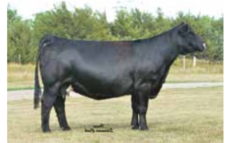
WAGR LULLABY 703T Paternal Granddam of Lot 33