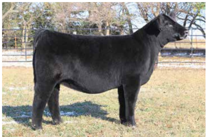
SJF HELEN OF TROY | Maternal Sister to the Dam of Lot 102

Confirmed safe in calf to OMF Epic E27 (ASA 3317371) due 2/27/23.