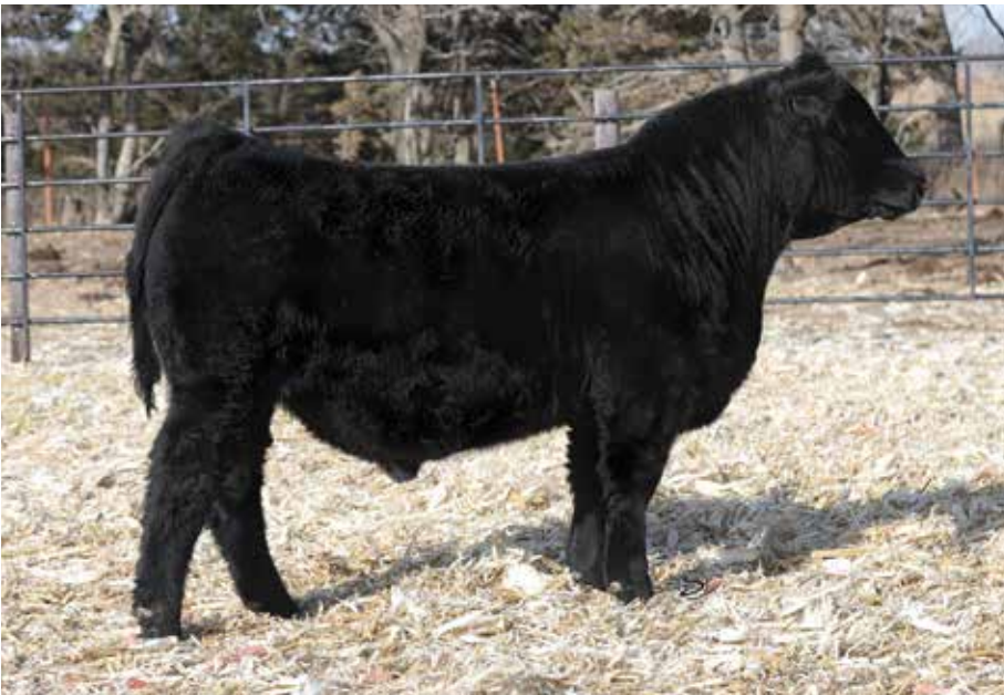
LOT 29 | GKS/ARROW H REVOLVER K015