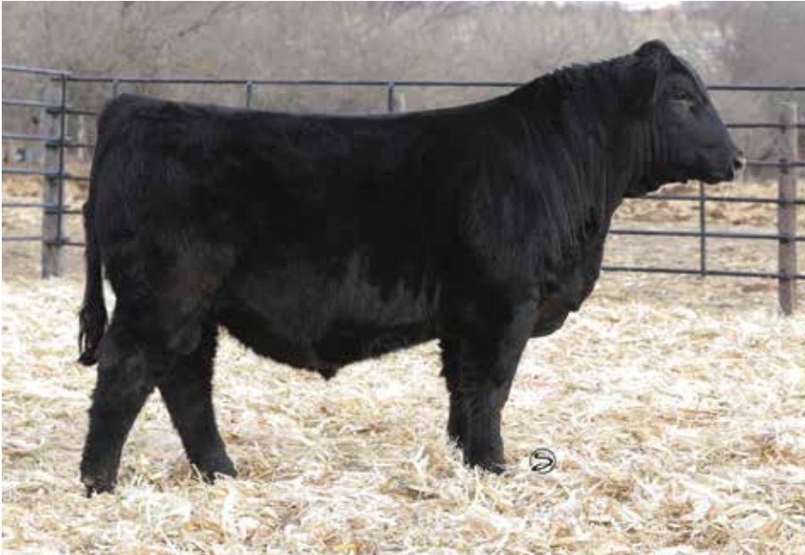
LOT 32 | OBCC COUNTERMEASURE 403K