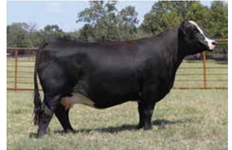
OBCC LOLA 137Z | Full Sister to Dam of Lot 28