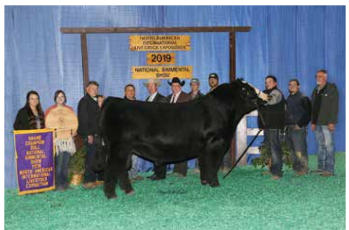
TJSC KING OF DIAMONDS | Sire of Lots 105-108