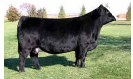
SS MAGNIFICENT DREAMS | Dam of Lot 29