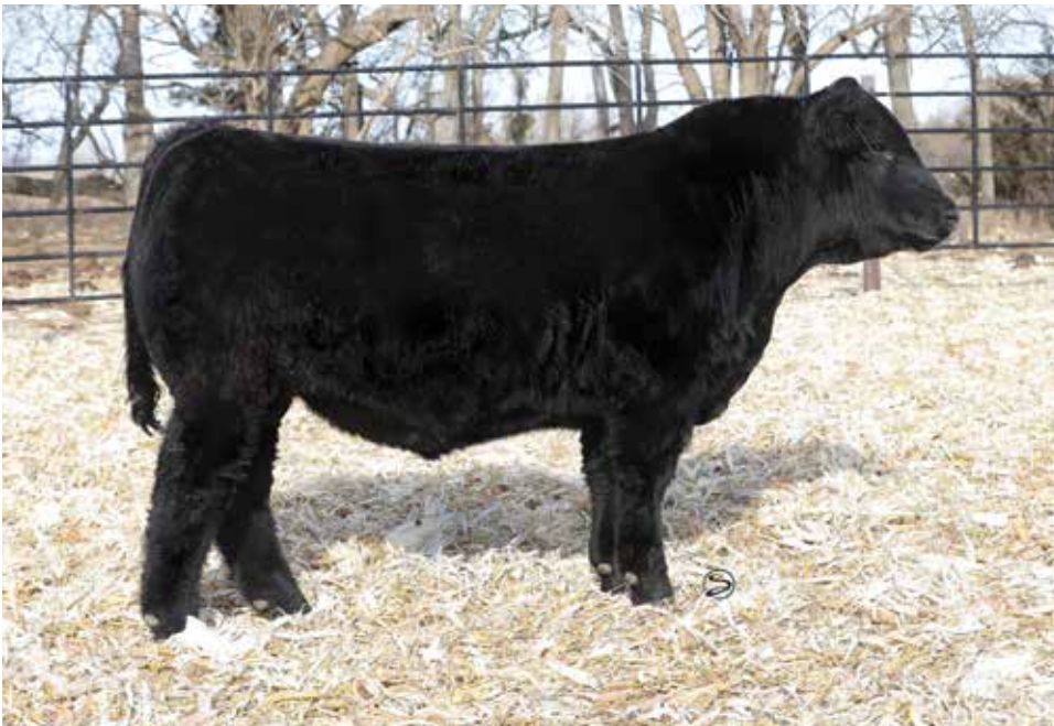
LOT 27 | BOWL REMEDY 110K