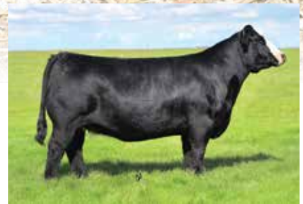
KCC1 HAVANA 83E Maternal Granddam of Lot 49