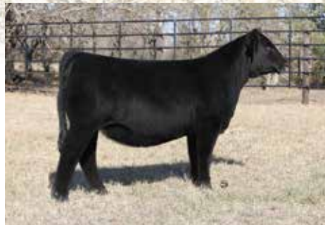
FRKG COUNTESS OF 948 12K $35,000 Full Sister to Lots 1-6