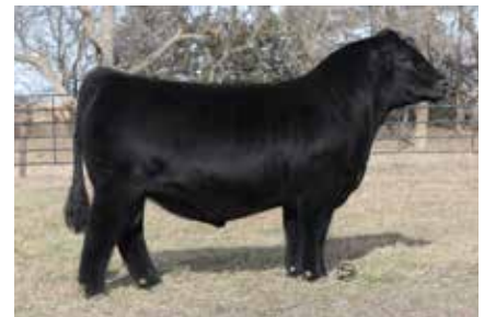
GPG ROYALTY 219H

2022 NAILE Grand Champion Purebred Simmental Bull