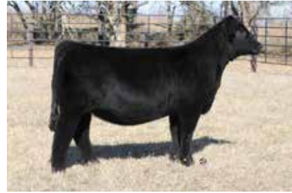
VCL COUNTESS OF 253 15K $15,000 Full Sister to Lots 16 & 17