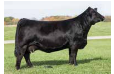
HF SERENA Maternal Granddam of Lot 50