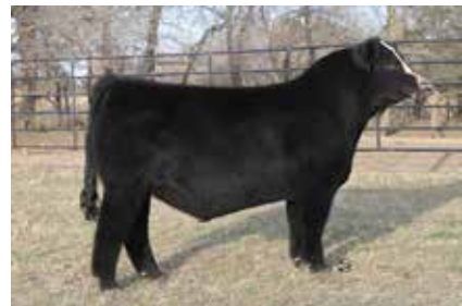
FRKG JUSTICE 113J $30,000 Herd Sire owned by Ohlrichs Cattle Company