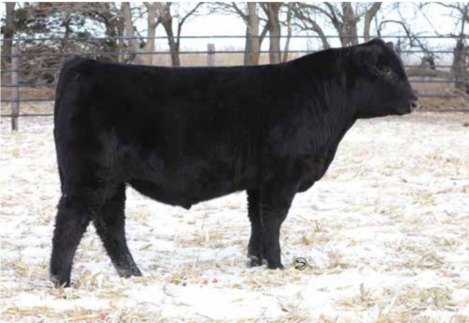
LOT 19 | MR CRUSADER 153K