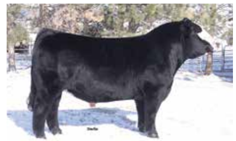
MR HOC BROKER Hartman Cattle Company Legacy Sire