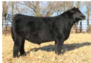
JUSTIFIED (deceased) $350,000 Maternal Brother to Lot 11