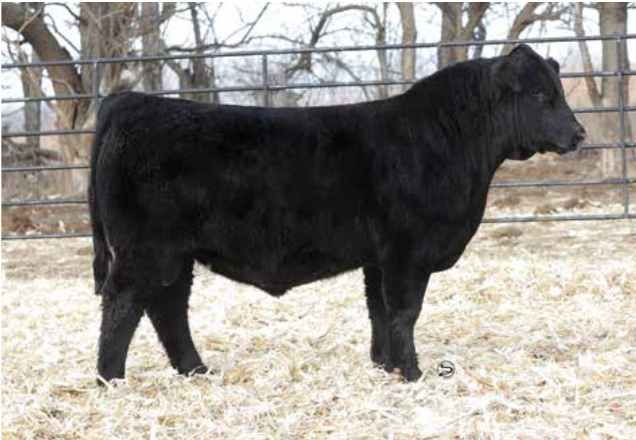
LOT 28 | MPJB REMEDY 49K