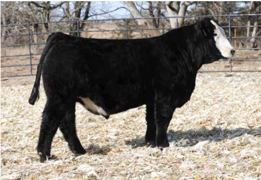
LOT 33 | MGI SWEETNESS 208G