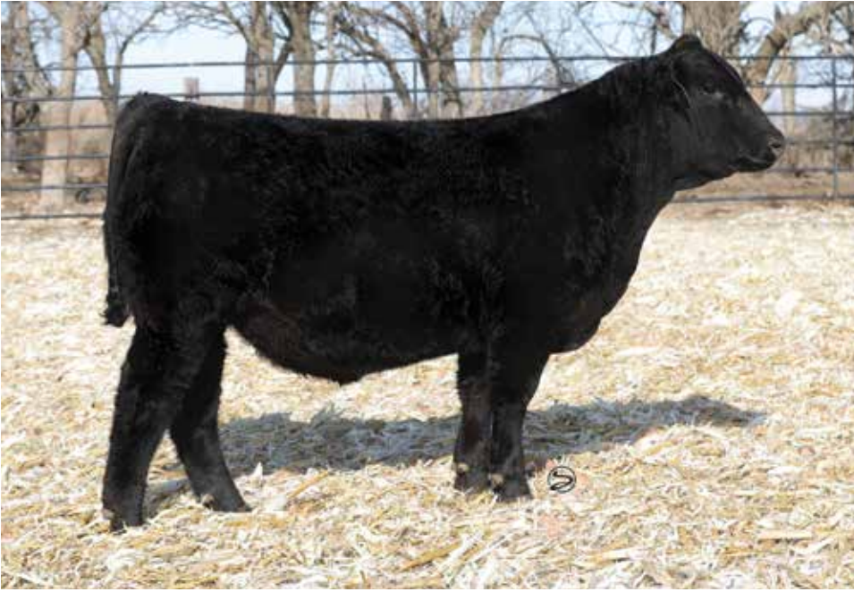
LOT 22 | 4/B MR REMEDY 35K