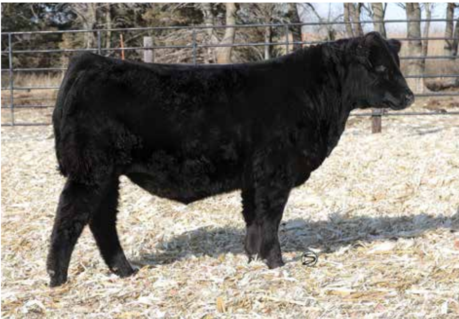
LOT 38 | MGI JARVIS 208K