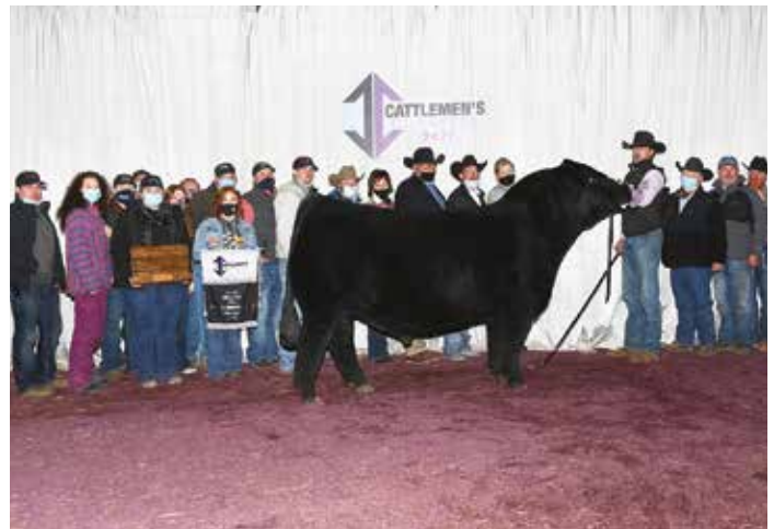
SO REMEDY 7F

2021 Cattlemen's Congress Grand Champion Purebred Simmental Bull