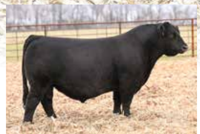
W/C STYLE 69E "FAMILY TRADITION" Sire of Lot 46