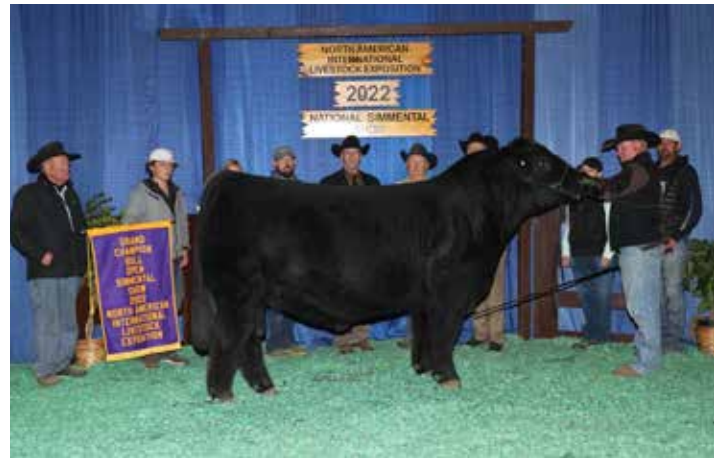
2022 NAILE Grand Champion Purebred Simmental Bull Congratulations GKB Cattle!