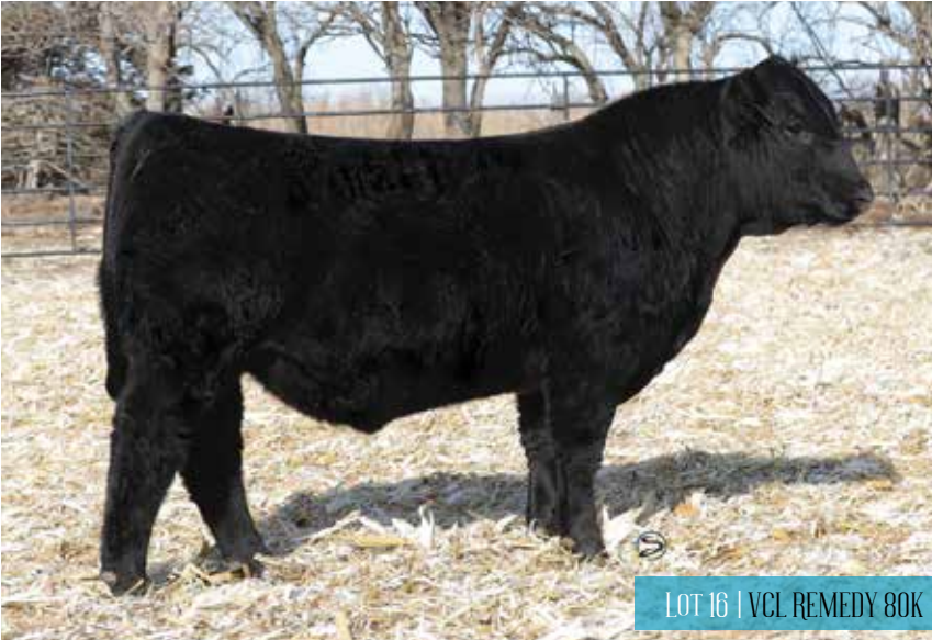
LOT 16 | VCL REMEDY 80K