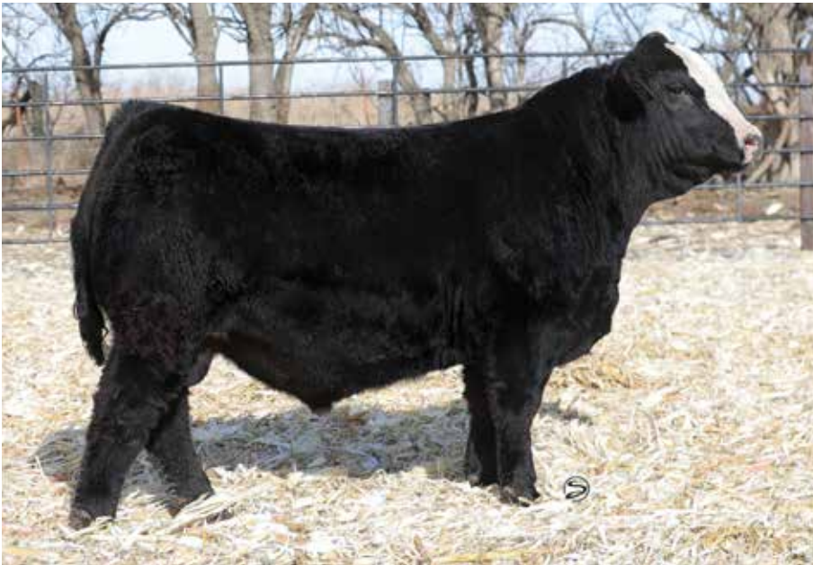
LOT 30 | BWL GOOD TIMES 94K