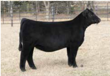
FRKG COUNTESS OF 948 11K $65,000 Full Sister to Lots 1-6