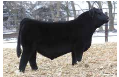
MLJM PATRON 17H

$87,500 Member of the "Cinderella" Cow Family!