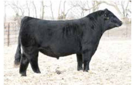
ACLL FORTUNE 393D | Sire of Lots 42-45