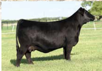
KCC1 SWC HARMONY 847H Dam of Lot 49