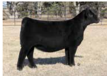
STCC NOBODY'S FOOL 047K $220,000 Maternal Sister to Dam of Lot 50