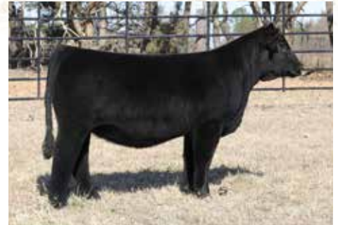
FRKG COUNTESS OF 948 13K $15,000 Full Sister to Lots 1-6