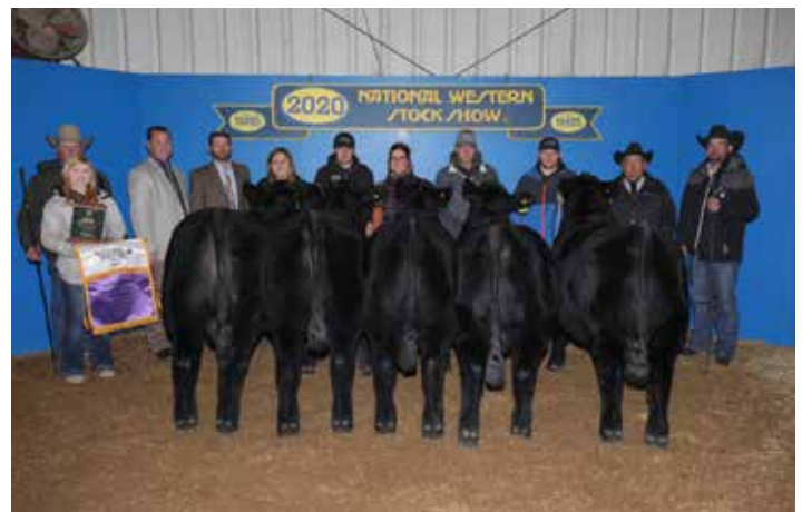
2020 NWSS Grand Champion Pen of Five Purebred Simmental Bulls