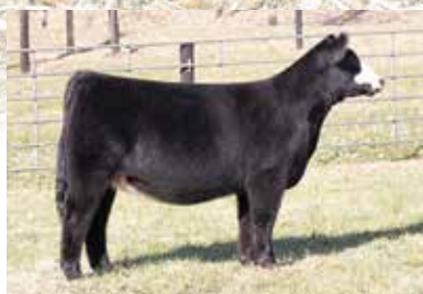
ROXI'S KANDACE $100,000 Maternal Sister to Lot 46