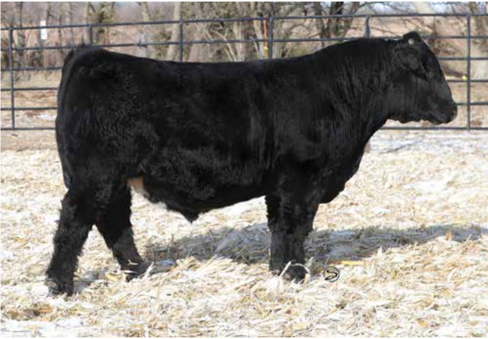
LOT 24 | BAILEY'S DGDC REMEDY 8387K