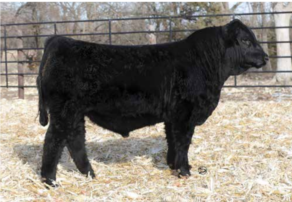
LOT 45 | MILLER'S FORTUNE 15K