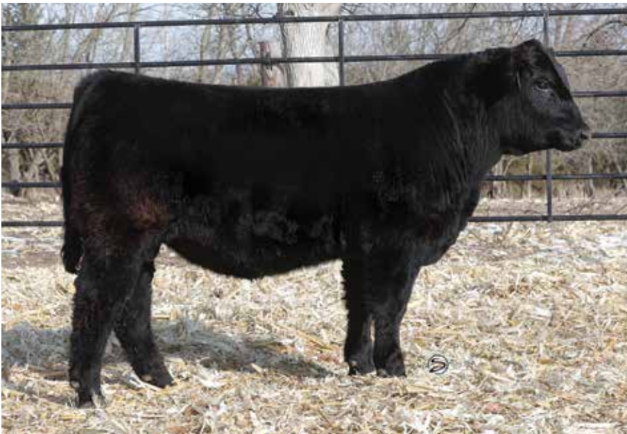
LOT 31 | DSFF REMEDY 694K