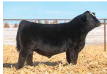
KCC1 COUNTERTIME 872H Sire of Lot 50