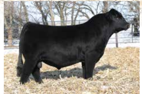
SO REMEDY 7F Sire of Lots 1-32