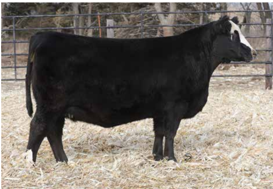
LOT 110 | SJF JORDYN