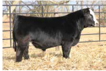
FORESIGHT 253G $20,000 Maternal Brother to Lots 16 & 17