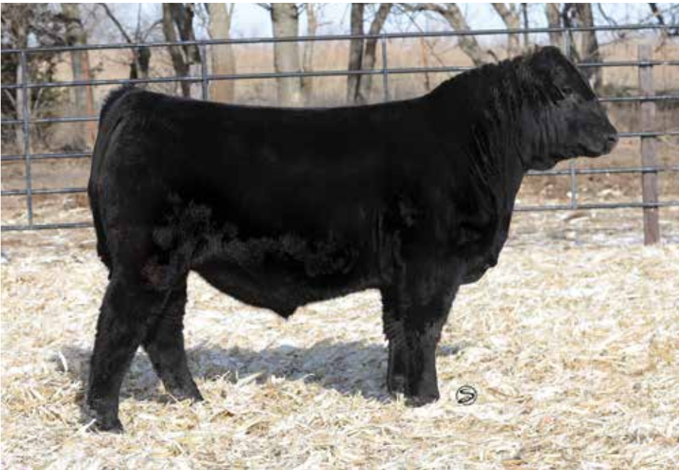
LOT 25 | HCCO REMEDY 516K