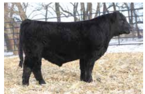
FORTUNE 80H Full Brother to Lot 44