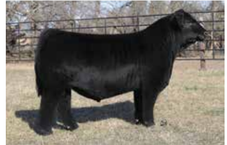
FRKG VICTORY 78J | $210,000 Maternal Brother to Lot 12