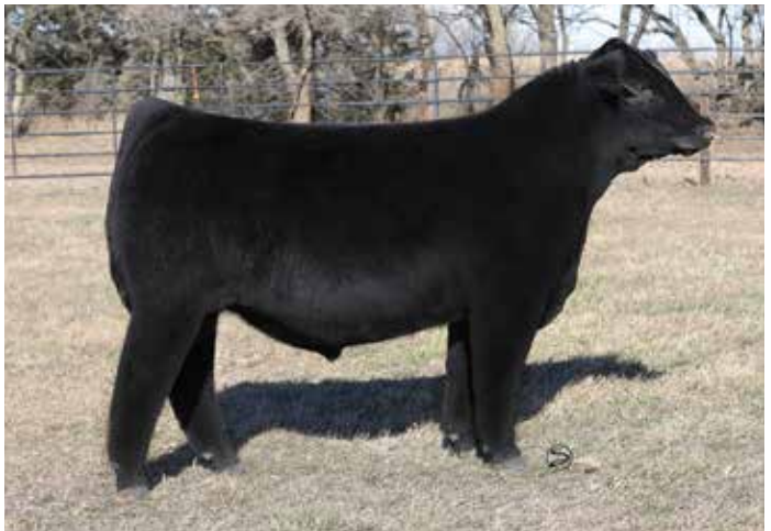
GPG DENSITY 153J | Full brother to Lot 14