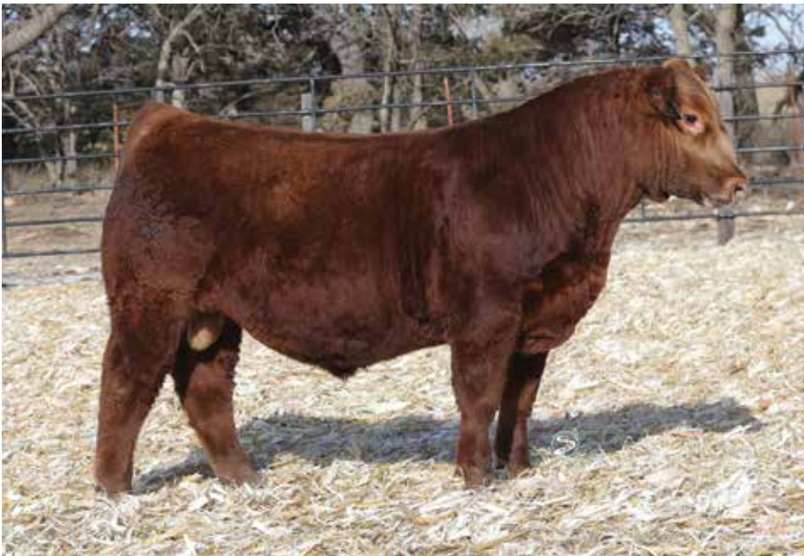
LOT 36 | DSFF REBEL 611K