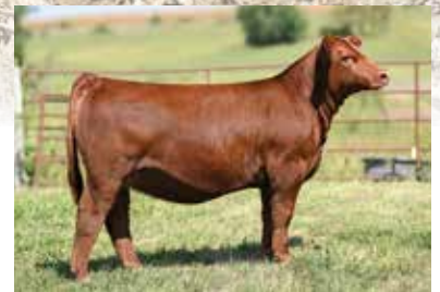
BAR O KARMA 027K | Full Sister to Lot 34