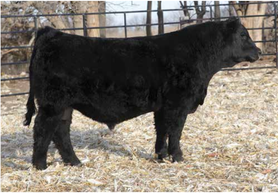
LOT 42 | MGI FORTUNE 231K