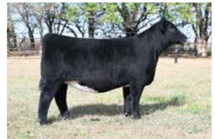
BAILEY'S WILDEST DREAM 101J $27,000 Full Sister to Lot 24