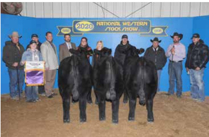
2020 NWSS Grand Champion Pen of Three Purebred Simmental Bulls