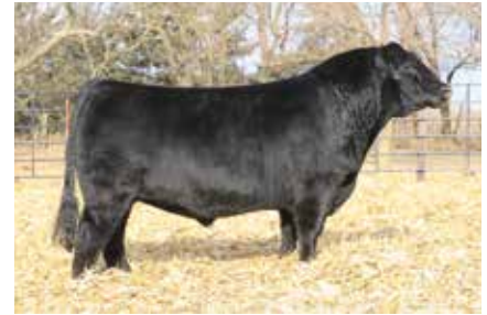
SWSN CASH FLOW 81E | Sire of Lot 37