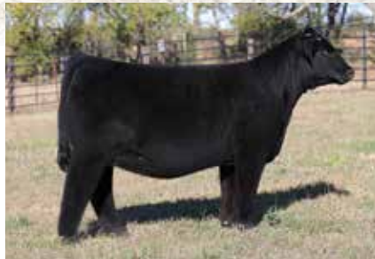
EVERHART'S PIXIE $23,000 Maternal Sister to Lot 51