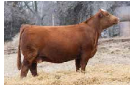
CTN SS BWL KINLEY D004 Dam of Lot 30