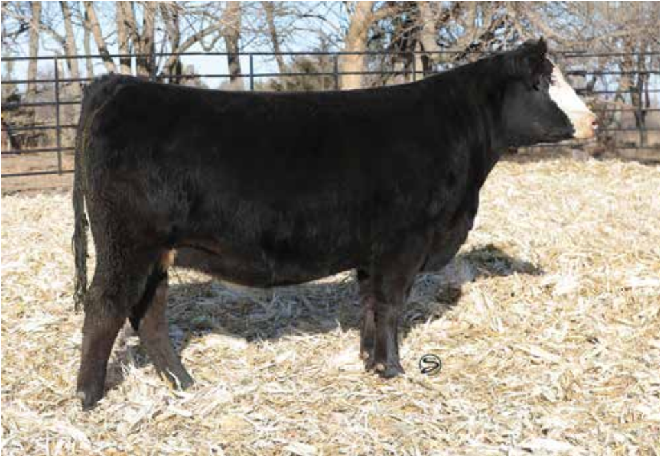
LOT 107 | SJF JOSIE