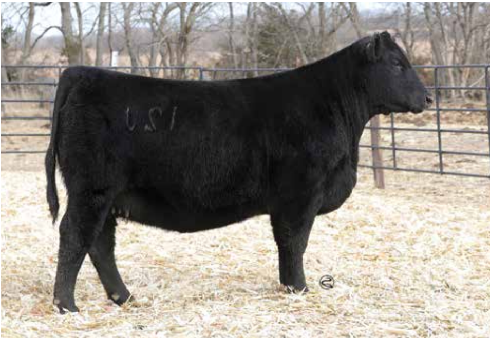
LOT 108 | SJF JAYDEN