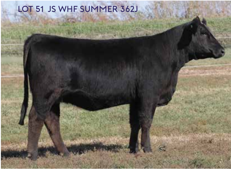
LOT 51 JS WHF SUMMER 362J