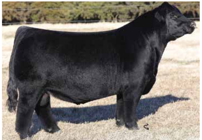
JSUL SOMETHING ABOUT MARY 8421 | Sire of Lots 4-7