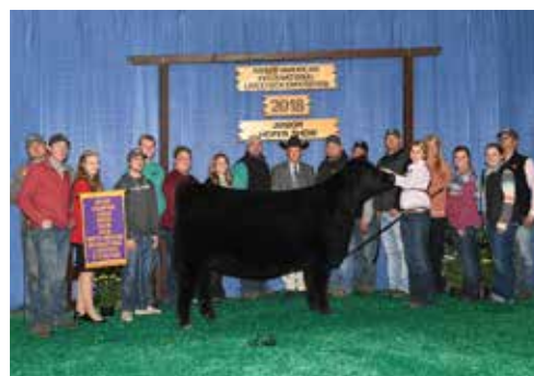
UDE ELLIE 153E | Dam of Lots 34 & 35