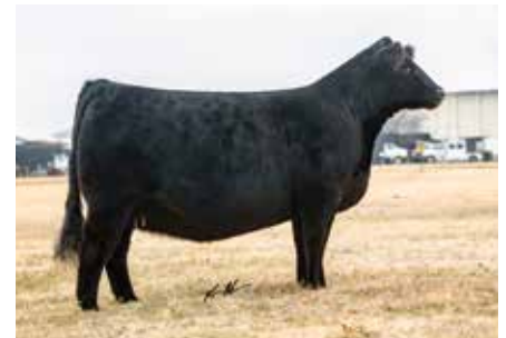
BT BLACK BEAUTY G7