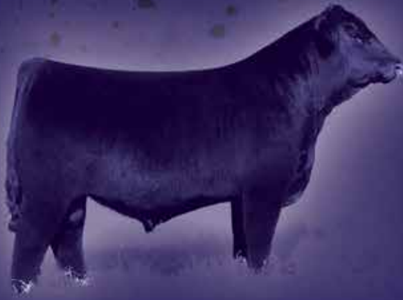
JS Keepin It 90 39H Maternal Brother to Lots 16-24