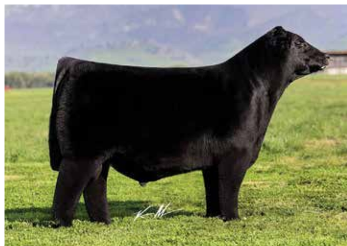
COLBURN PRIMO 5153 | Sire of Lot 24

LOT 24 1/2 SM 1/2 AN ASA: 4092540 BD: 2/27/22 TATTOO: 8K