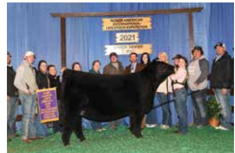
CCS/JS Summer 13H | 2021 NAILE Grand Champion Simmental Heifer and Maternal Sister to Lots 51 & 52