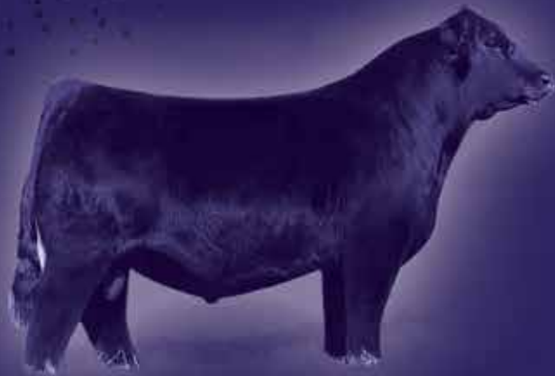
WHF/JS/CCS Double Up G365 2021 Cattlemen's Congress Reserve Grand Champion Simmental Bull and Maternal Brother to Lots 1-13