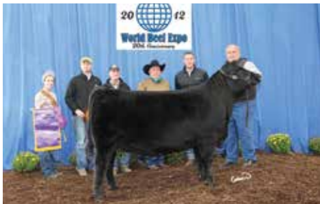
WAF BARBARA 101 2012 World Beef Expo Grand Champion Angus Heifer & Dam of Lots 58-60

There is no question why these ladies look like they do when you introduce quite possibly the winningest mating in the last 5 years of the Simmental breed in the form of JBSF Logic 5E. The W/C Relentless 32C influence on the Brooks Steel Magnolia X57 donor is no secret, it's a household name among the Simmental breed and has been recognized due to the nationwide domination in the show ring. These ladies are all carrying the goods themselves with the service of THSF Lover Boy B33 on board!