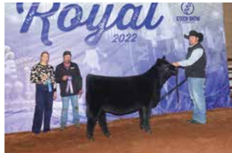
CCS/JS Summer 30K American Royal Division Champion Percentage Simmental Heifer