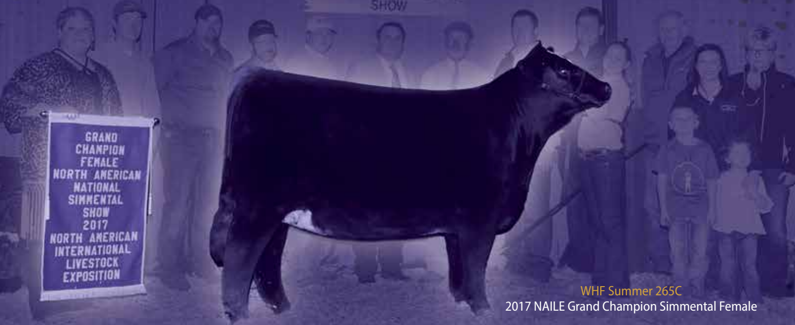
WHF Summer 265C 2017 NAILE Grand Champion Simmental Female