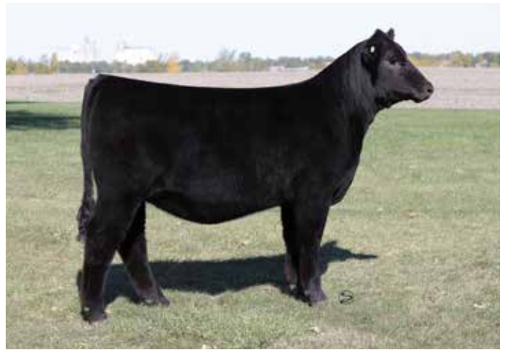
LOT 5 CCS / JS SUMMER 35K