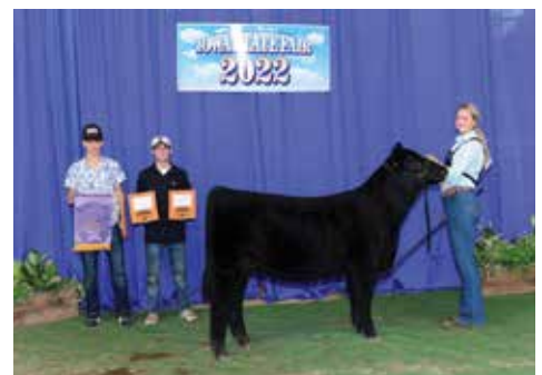
CCS/JS SUMMER 1K 2022 IA State Fair Calf Champion