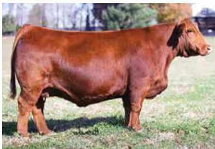
WHF SIERRA 2455 3rd Generation Dam of Lot 53