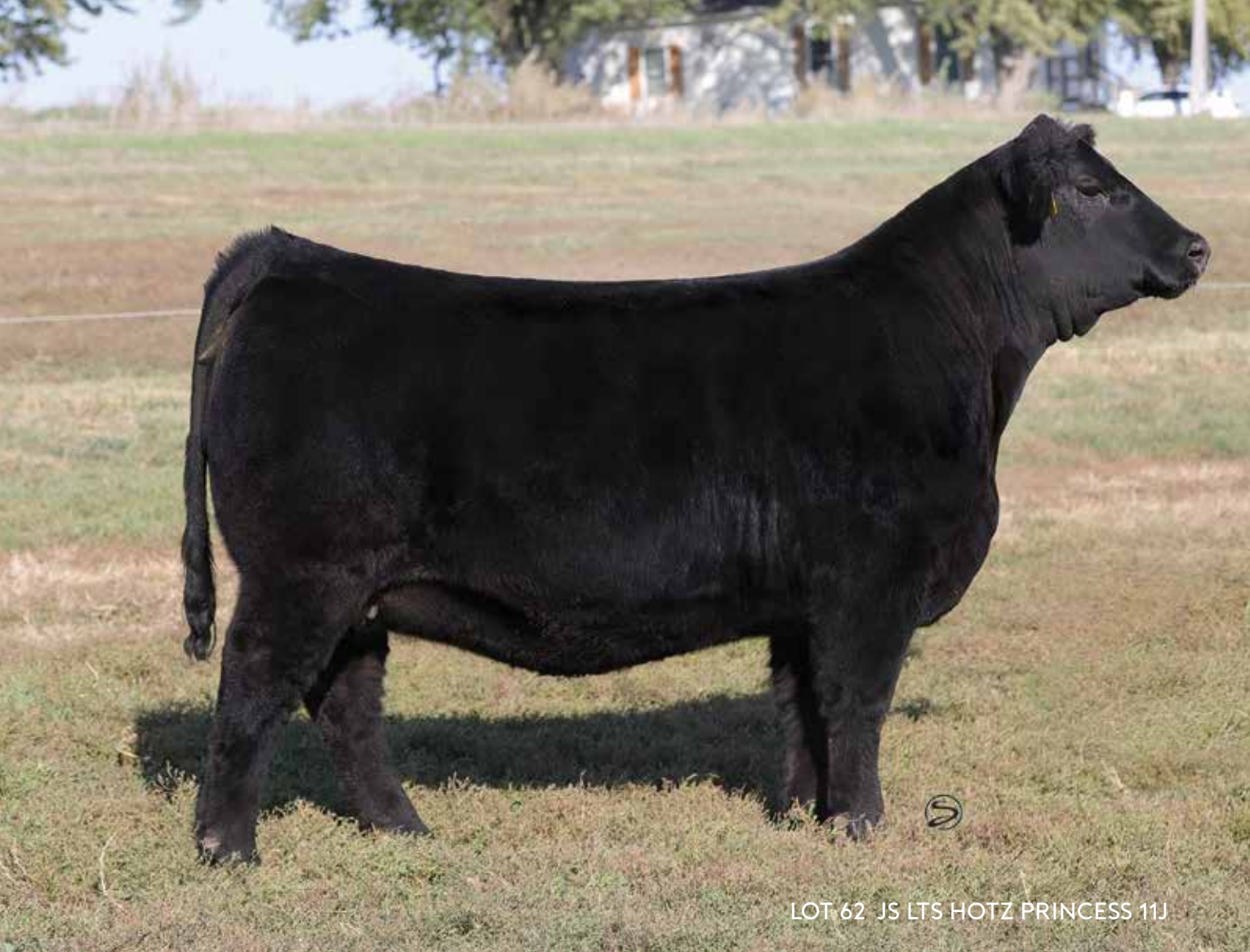
LOT 62 JS LTS HOTZ PRINCESS 11J

On the Simmental side of the equation, this pedigree offers cows like BF Miss Crysteel Tango who has had a major influence on the Hartman bull battery and annual female offering for several years, as well as the great Miss Werning KP 8543U that needs little attention based on how often she pops up in pedigrees nationwide. Buy with confidence and reap the rewards of what these two have to offer your program.