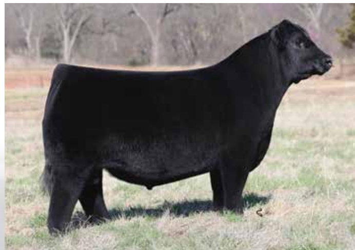
GATEWAY FOLLOW ME F163 | Sire of Lots 11-13

LOT 12 1/2 SM 1/2 AN ASA: 4099541 BD: 4/7/22 TATTOO: 44K