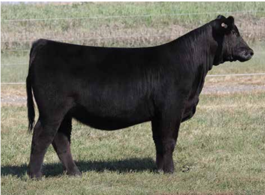
LOT 31 JS BURNING POWER 27K

The JS entourage thought highly of this animal and like anyone else that appreciates the best of the best, they felt like this one was a different mating, and the quality was where they like to play ball so hence the change of zip code for the BTLY Sweet Nothings 209G female. The CDI Innovator 325D sire choice on this female has yet to let the program down, this is the second consecutive female from this young cow sired by the likes of 325D. Expect nothing but what's proven with this young April born female!