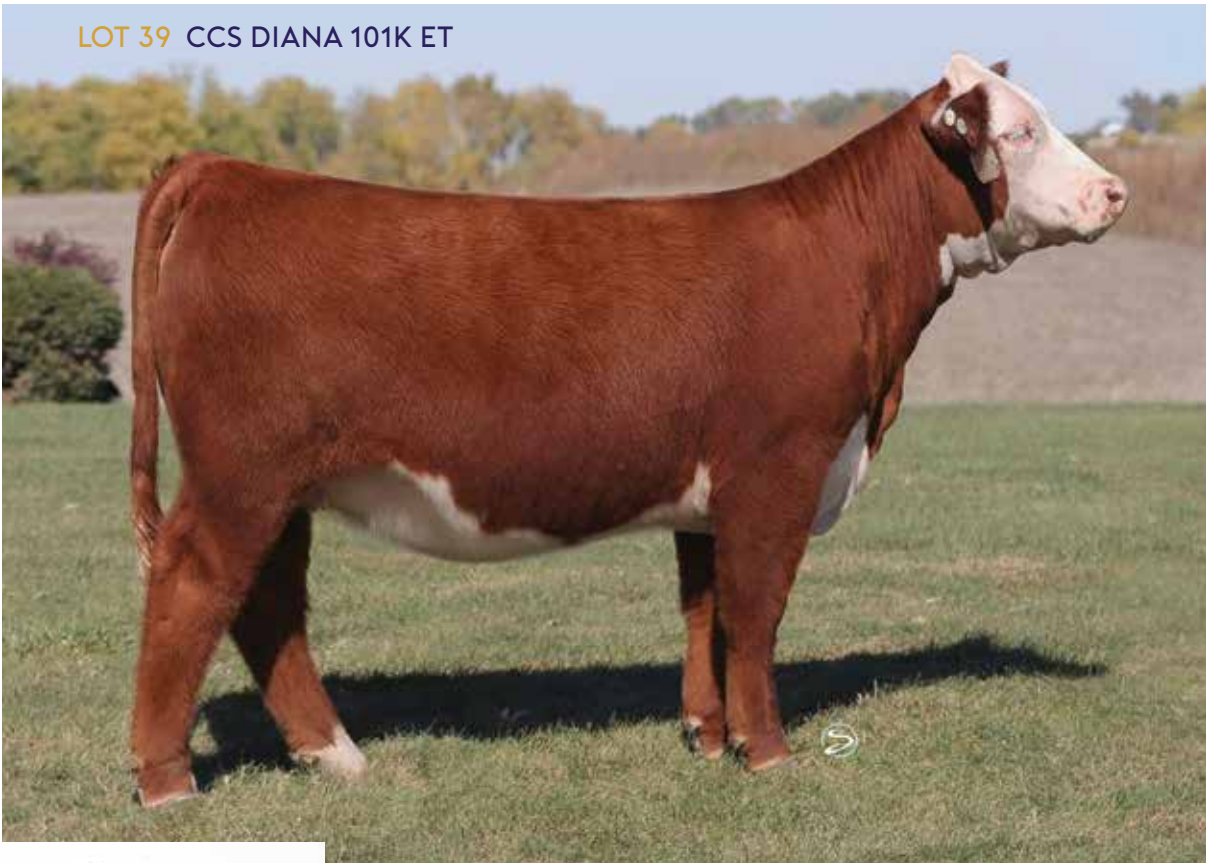
LOT 39 CCS DIANA 101K ET