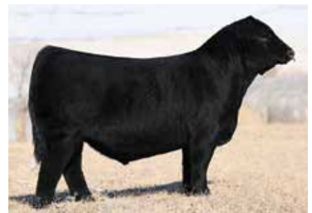
WHF ENTOURAGE H450 Maternal Brother to Dam of Lot 53