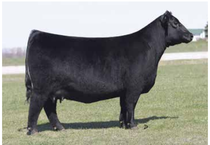
GREIMANS LADY NELLIE 298 | Dam of Lot 36