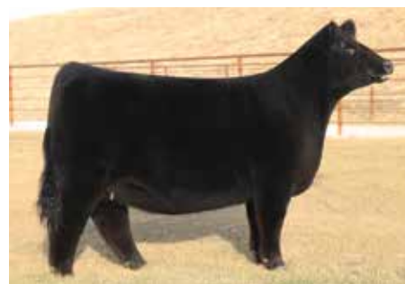
JSUL WHO DAT FETTY 6322D Full Sister to Dam of Lot 38