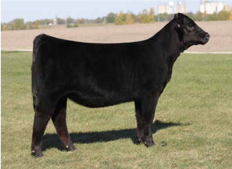
LOT 28 JS PEARL 53K