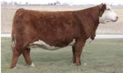
SULL TCC DIANA 4068B ET | Dam of Lot 39