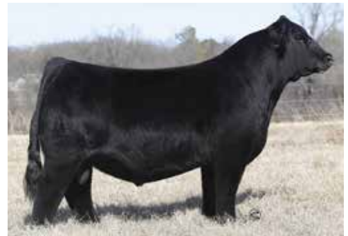
WHF/JS/CCS DOUBLE UP G365 Sire of Lots 20 & 21

Here is a sister duo sired by the 2021 Reserve National Champion Simmental Bull at the Cattleman's Congress, WHF/JS/CCS Double Up G365. "Double Up" has experienced heavy use in the breeding box with the weighted average on the heifer side. Most have experienced true calving ease with blended eye appeal, balance, and desirable shape as the end result. This is a very potent and dense mating in terms of total lineage value related to the JS program. When combined in a pedigree, WHF Summer 365C and CLRS Dairy Queen 606D, have propagated some of the highest valued and critically acclaimed stock that this program has generated over the past few years. It is only in an intensely managed embryo transfer program such as JS Simmentals does one find opportunities like this to latch onto. The stock is an elite representation of extra length, true shape, bone, and quality at the surface, just as one would expect. Set the satchel down and study the lesson that is before you with serious consideration!