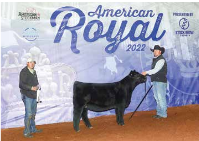
CCS / JS SUMMER 36K 2022 American Royal Reserve Division Champion Purebred Simmental Heifer