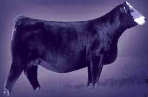
JS Flirt Away 52H Full Sister to Lot 25