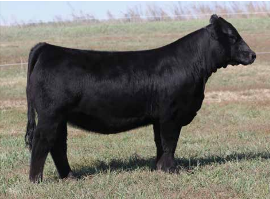
LOT 30 CCS/JS SWEETS 10K

The post "Boots" period led this program to multiple significant frozen genetic opportunities because of her dominant winning record and being the only female to ever dominate the AJSA Summer Classic and capture the coveted title of the "Triple Crown". The Baty family of Colorado has invested in the 59Y donor embryo offering more than once and that's what leads us to the next female represented as lot 30.