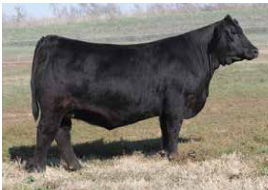
LOT 60 JS LTS HOTZ BARBARA 25J

AI BRED 5/1/22 TO THSF LOVER BOY B33 (ASA 2983443). PE 5/28/22-6/23/22 TO HOTZ-JABS HOLIDAY PAY 191G (ASA 3608283). LIKELY SAFE AI. ESTIMATED DUE 2/8/23.