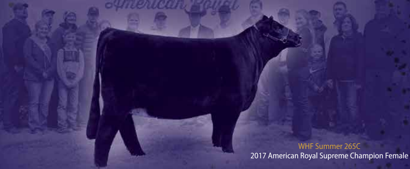
WHF Summer 265C 2017 American Royal Supreme Champion Female