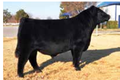
EXAR BLUE CHIP 1877B Full Brother to Dam of Lots 61 & 62