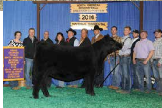
HILB CRAZY N LOVE A475S | 2014 NAILE & 2015 NWSS Grand Champion Purebred Simmental Heifer and Full Sister to Dam of Lots 54 & 55