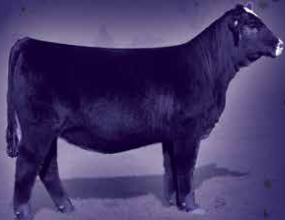
CCS/JS Summer 33H 2021 NAILE Grand Champion Junior Simmental Heifer and Maternal Sister to Lots 1-13