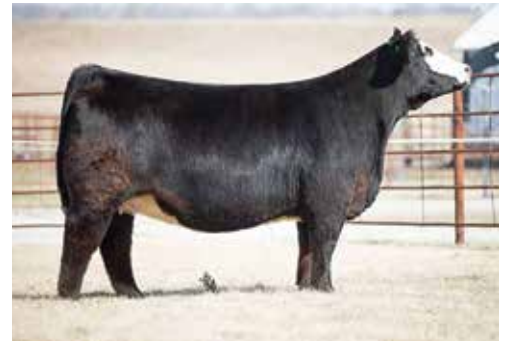
LLSF BABY STEEL C908 | Dam of Lot 56

The next female is sired by the $120,000 KCC1 Exclusive 116E, a herd sire produced in the Kearns Cattle Company program that is directly influenced by TKCC Victoria 57A and Ford RJ Dolly Y83, the two matrons that helped build the western Nebraska operation. The dam of 20J is backed by the legendary LLSF Urababydoll U194, the dam of the influential LLSF Pays to Believe ZU194 as well as SC Pay the Price C11. These two multiple-time National Champions have left their mark on the Simmental breed as two of the most consistent and prolific sons of the great CNS Pays to Dream T759 in existence. The dam of 20J is LLSF Baby Steel C908, the striking baldy female that is employed in the Lone Tree Simmentals program. Proven cow families stacked generation after generation. She's been confirmed safe to THSF Lover Boy B33, a direct son of the legendary 015U, therefore incorporating yet another genetic line of elite status within the Simmental breed!