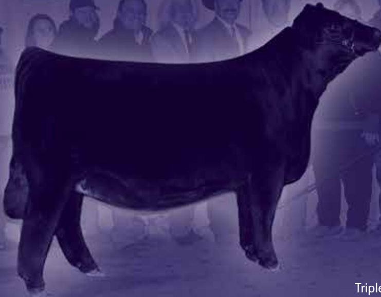
JS Black Satin 9B "Boots" Triple Crown Winning Purebred Simmental