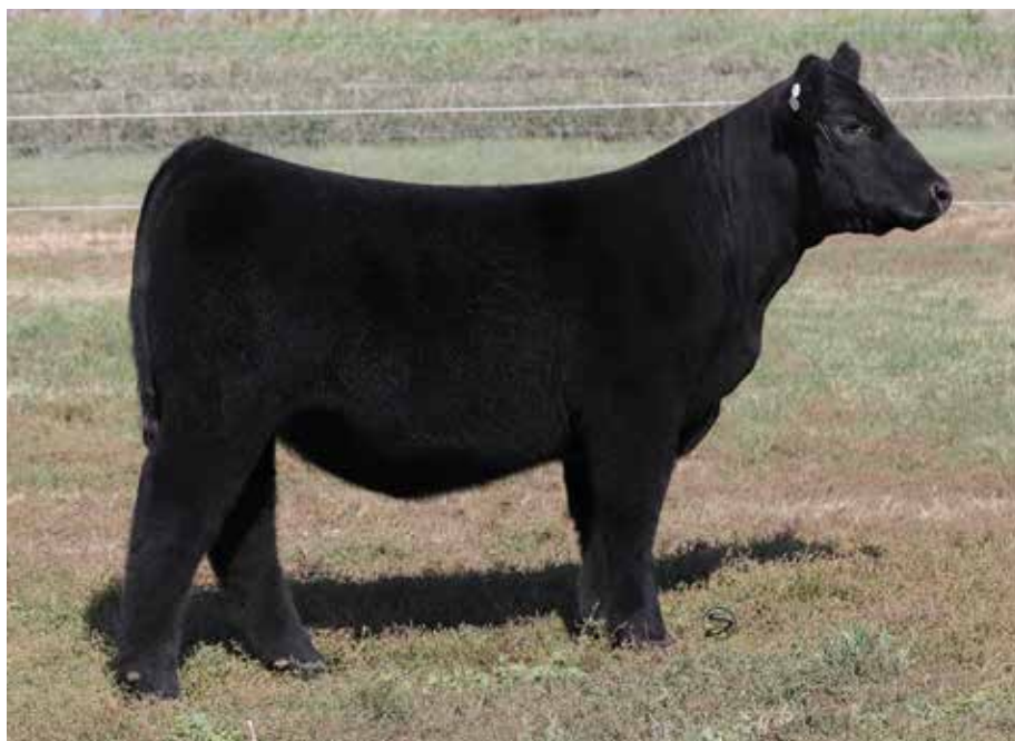
LOT 37 JS FOREVER GIRL 302K