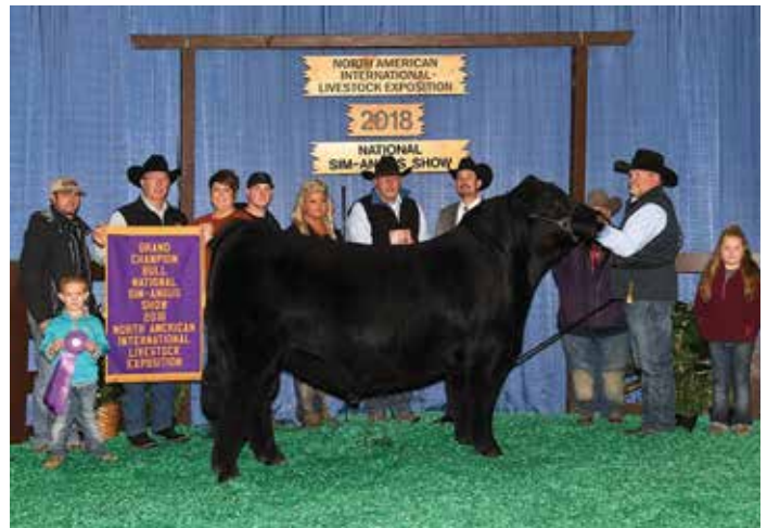
WLE COPACETIC E02 | Sire of Lot 1