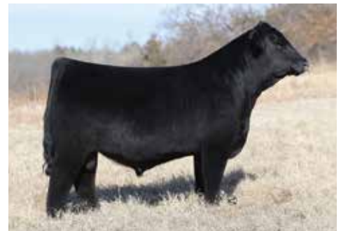
JS KEEPIN IT 90 39H | Sire of Lots 2 & 3