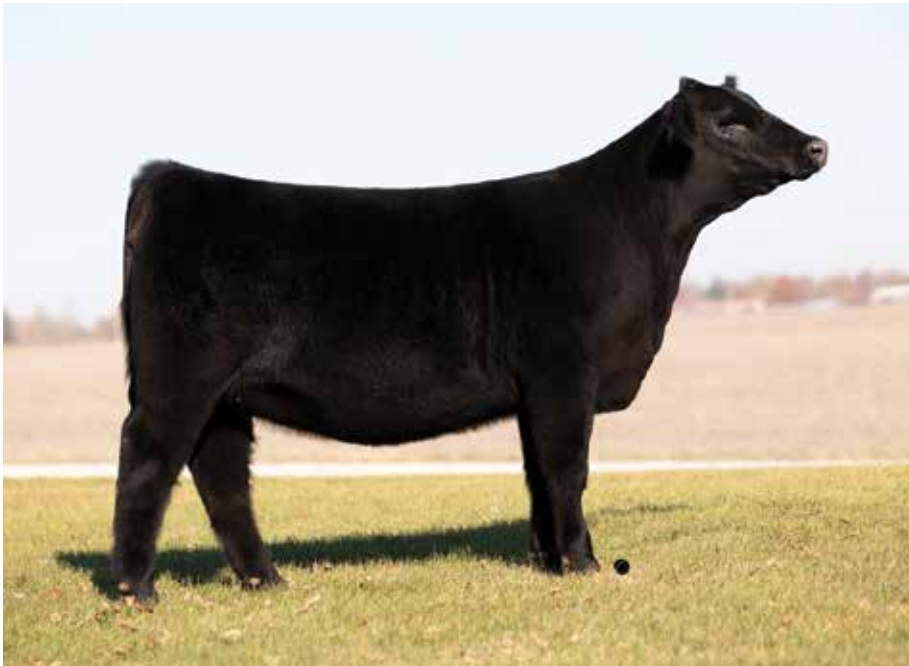
LOT 32 JS HARKERS BLACK BEAUTY K7

Harkers Unleashed is a new member on the herd sire roster at JS Simmentals. He was a dominant force in the show ring for the Harker family, with wins across the country. A full sister to Harkers Unleashed, Harkers Honey Bea H116, was the 2021 Iowa State Fair Supreme Champion 4-H Breeding Heifer. She continued her dominant campaign in Louisville where she was selected as the Grand Champion Junior Percentage Simmental Heifer and finished as the 3rd Overall Junior Breeding Heifer at the largest and most competitive junior heifer show in North America. The maternal side of this female's pedigree traces to the great TCC Beauty Z75, the 2014 NWSS Reserve Division Champion that was shown by the Patton family. BT Black Beauty G7 is the dam that supported K7, a direct daughter of the legendary Profit. This February born double half is bred in the purple to say the very least!