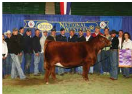
WHF/PRS/HPF ALLEY 247Y Maternal Sister to Granddam of Lot 53