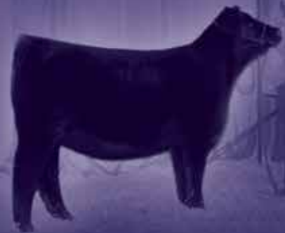
JS Dairy Queen 27H Full Sister to Lot 24