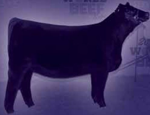
JS Dairy Queen 56G 2020 World Beef Expo Reserve Grand Champion Heifer Full Sister to Lots 17-19