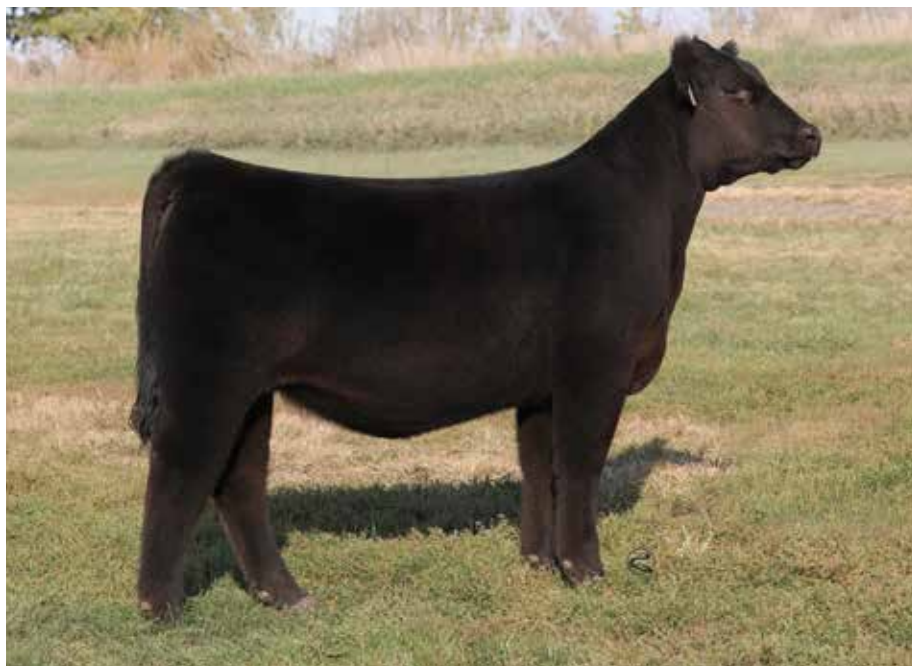
LOT 38 JS TBK OCC TOTAL GIRL 303K