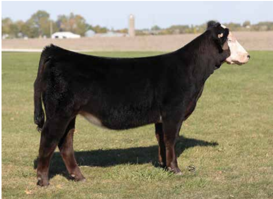
LOT 33 JS PEARL'S KMS OPAL

2022 Cattlemen's Congress Grand Champion Percentage Simmental Bull and Sire of Lot 32