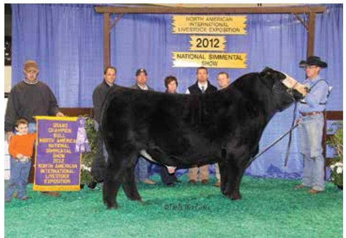
MR HOC BROKER | Sire of Lots 17-19