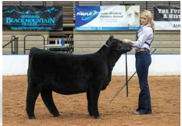
CCS JS SUMMER 31H | Full Sister to Lots 11-13