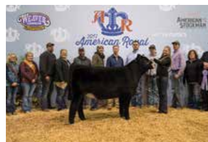
WLE Missy E3055 2017 American Royal Reserve Champion Percentage Simmental Female