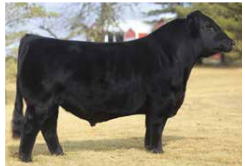
CDI INNOVATOR 325D | Sire of Lots 30 & 31