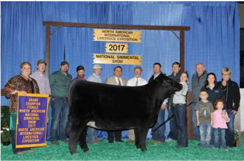
WHF Summer 365C | 2017 NAILE Grand Champion Simmental Heifer