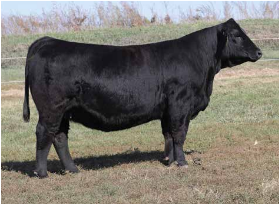
LOT 56 JS LTS HOTZ BABY STEEL 20J

The next female is sired by the $120,000 KCC1 Exclusive 116E, a herd sire produced in the Kearns Cattle Company program that is directly influenced by TKCC Victoria 57A and Ford RJ Dolly Y83, the two matrons that helped build the western Nebraska operation. The dam of 20J is backed by the legendary LLSF Urababydoll U194, the dam of the influential LLSF Pays to Believe ZU194 as well as SC Pay the Price C11. These two multiple-time National Champions have left their mark on the Simmental breed as two of the most consistent and prolific sons of the great CNS Pays to Dream T759 in existence. The dam of 20J is LLSF Baby Steel C908, the striking baldy female that is employed in the Lone Tree Simmentals program. Proven cow families stacked generation after generation. She's been confirmed safe to THSF Lover Boy B33, a direct son of the legendary 015U, therefore incorporating yet another genetic line of elite status within the Simmental breed!