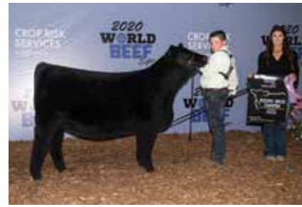
JS Dairy Queen 56G 2020 World Beef Expo Reserve Grand Champion Heifer