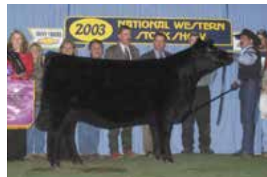
Greens Princess 1012 Legendary Maternal Granddam of Lots 61 & 62