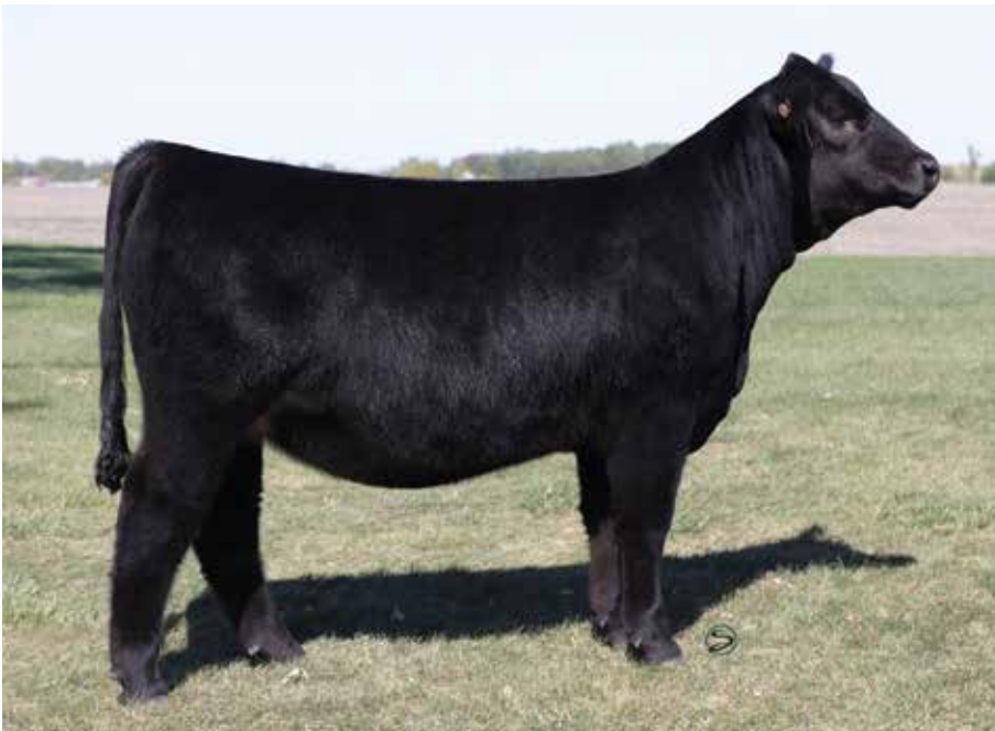
LOT 20 JS DAIRY QUEEN 49K