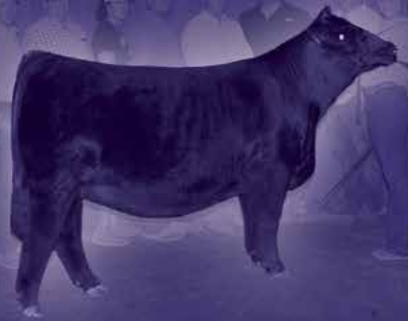
JS Dairy Queen 57G 2021 IA State Fair Grand Champion Purebred Simmental Heifer Full Sister to Lots 17-19