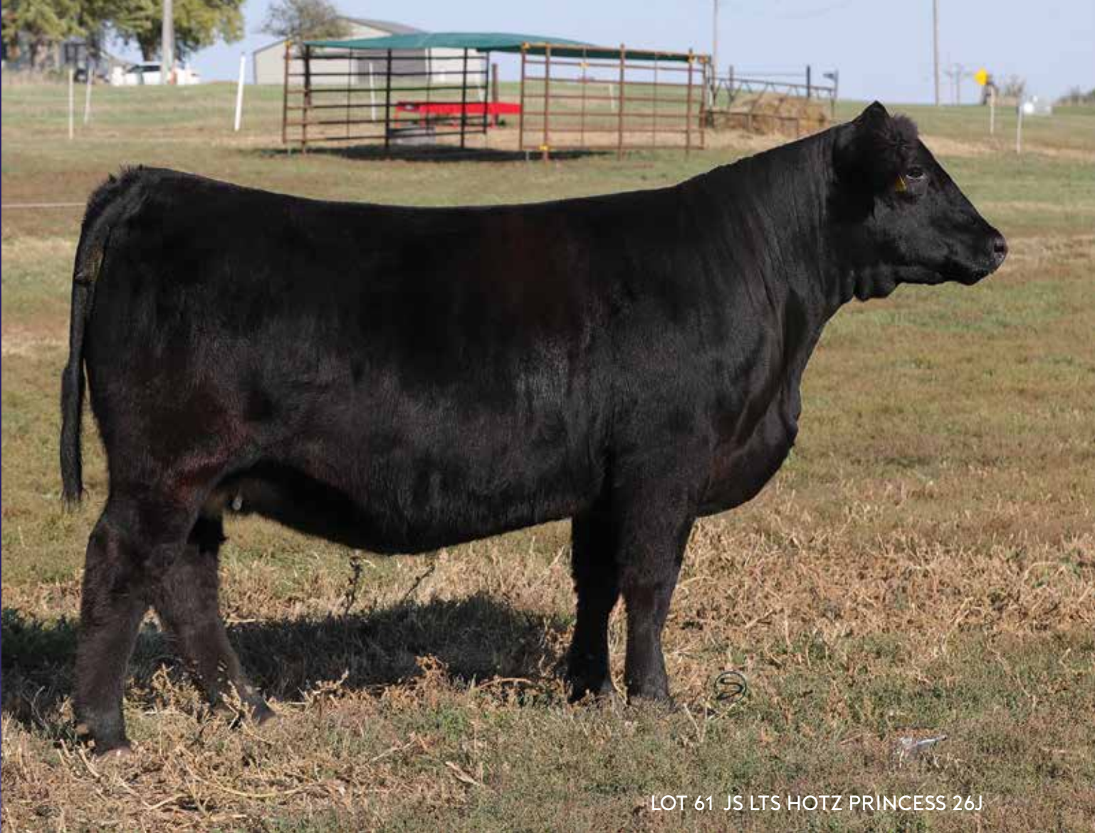
LOT 61 JS LTS HOTZ PRINCESS 26J

The concluding duo of the offering stems from yet another namesake cow family in the beef business. Larry Green of Montana led quite possibly one of the best strings of Angus cattle across the tan bark as any one breeder in the late 1990's and early 2000's. In that string would have been the matriarch know as Greens Princess 1012. Express Ranches acquired 1/2 interest in Greens Princess 1012 for $200,000 at the 2004 Bases Loaded Sale held in conjunction with the National Western Stock Show! She was a female that would not only influence the long game of their respected program but would also continue to endure the test of time for generations in the Angus breed. This duo is from a Dameron First Class sired daughter of 1012 by the name of EXAR Princess 3893. She is a full sister to the popular AI sire, EXAR Blue Chip 1877B and would also be a maternal sister to the maternal great granddam of the very popular Angus sire of center stage presence known as Conley Lead The Way 0738. Countless high sellers and show ring champions to carry the EXAR prefix stem back to the influence of the legendary "1012"... power in the blood!