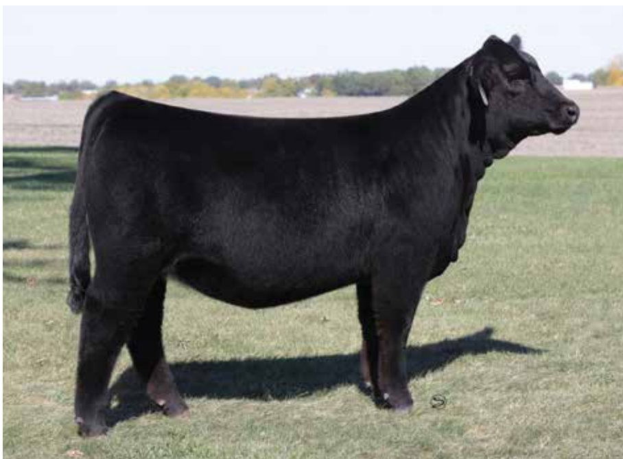
LOT 27 JS FLIRT AWAY 31K

The "Champ" did exactly what we thought he would when mated to the great 59Y. Allow us to present a pair of sisters by WHF/ JS/CCS Double Up G365 that have the added body, preferred maturity pattern, and that trademark extension that their donor dam is known for! Out of all the sires this cow has been mated to, we feel like this mating is the most consistent. Consistency in genetics is generally derived by stacking the most proven dams on top of one another.