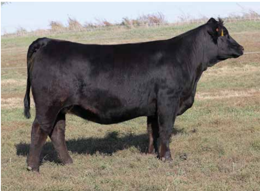
LOT 57 JS LTS HOTZ FEVER 22J

HTP/SVF Duracell T52 regained popularity late in his tenure as an AI sire. He was always in the shadow of his flush mate brother, HTP/SVF In Dew Time, until the show side of the Simmental business experienced what HPF Quantum Leap Z952 was capable of siring. HPF Quantum Leap Z952 is the leading direct son of HTP/SVF Duracell T52 that revived his sire's usage. As he was used on more and more of the elite cows in the breed, his service and notoriety has become more visible. He was always the bigger hipped, bolder backed, more high tying of the brothers and his influence has proved all that and more!