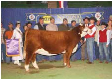
TCC MS DIANA 01 Legendary Maternal Granddam of Lot 39