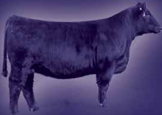
JS Dairy Queen 29F Maternal Sister to Lots 16-24