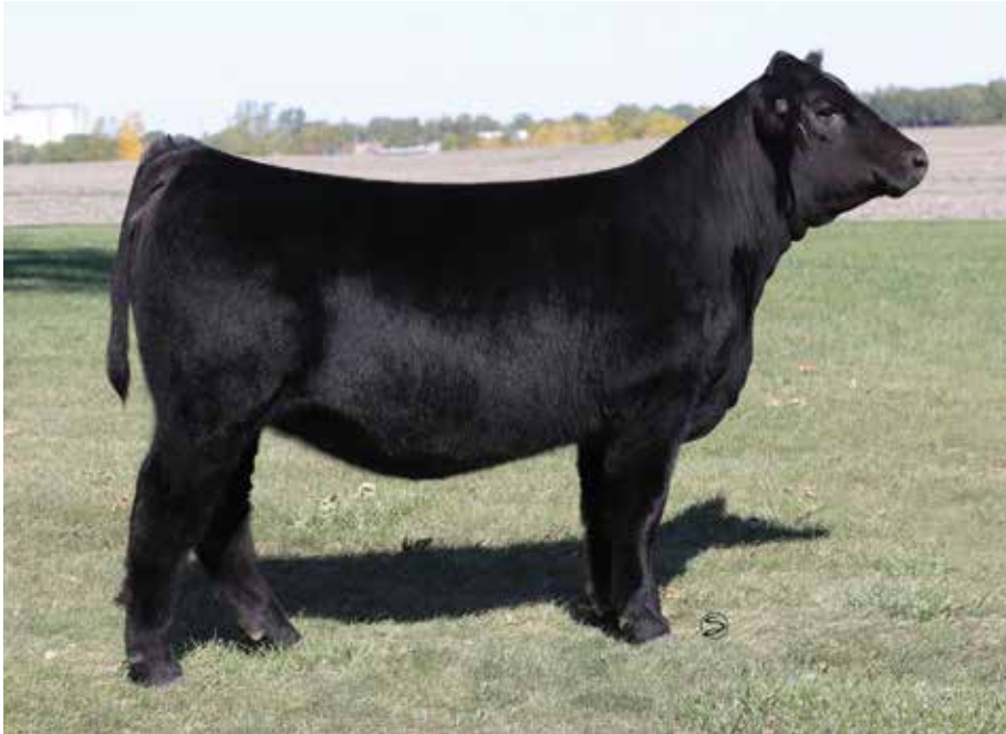
LOT 22 JS DAIRY QUEEN 42K