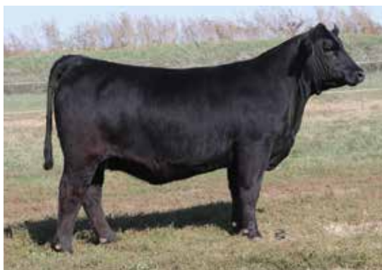
LOT 59 JS LTS HOTZ BARBARA 24J

AI BRED 5/2/22 TO THSF LOVER BOY B33 (ASA 2983443). PE 5/28/22-6/23/22 TO HOTZ-JABS HOLIDAY PAY 191G (ASA 3608283). LIKELY SAFE AI. ESTIMATED DUE 2/9/23.