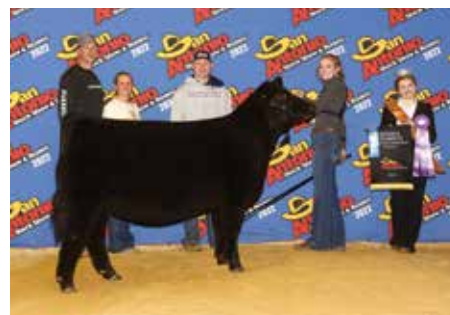
TBK PREMIERE GIRL 2022 San Antonio Reserve Grand Champion Chianina Heifer and Full Sister to Lot 38