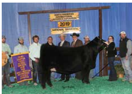
JBSF BRECKYN 6F 2019 NAILE Grand Champion Simmental Heifer & Full Sister to Sire of Lot 8