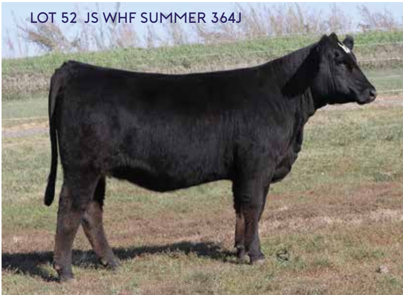
LOT 52 JS WHF SUMMER 364J