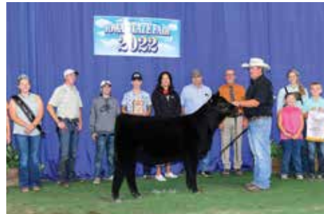
CCS/JS Summer 30K 2022 IA State Fair Reserve Grand Champion Percentage Simmental Heifer

This mating has generated a lifetime average north of $15,000 over the past two sales, and rightfully so. These are the kind that bring quality and verification to the SimGenetic business. The best of the Simmental breed complimented by the best of the Angus business...what more can one say! Genetics so pure to the seedstock business on both sides leave nothing to question when you evaluate these gems with your very own eyes. The cattle by Gateway Follow Me F163 have been very consistent and true, with added substance of bone, foot circumference, and profile build. Conley Lead The Way 0738 is making his mark on the Angus sale scene as one of the first son of Gateway Follow Me F163 that could be besting the footsteps set forth by his sire and the daughters are proving to be generators as well! We believe in this mating and what it offers to a broad spectrum of beef cattle enthusiasts, especially to those that enjoy the thrill of the challenge and chase of gathering banners. Enjoy this trio of siblings... study them and invest in one or all three! That will be left for you to decide your level of commitment to quality in the SimGenetic barn!