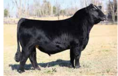
CCS/WHF OL' SON 48F | Full Brother to Lots 51 & 52