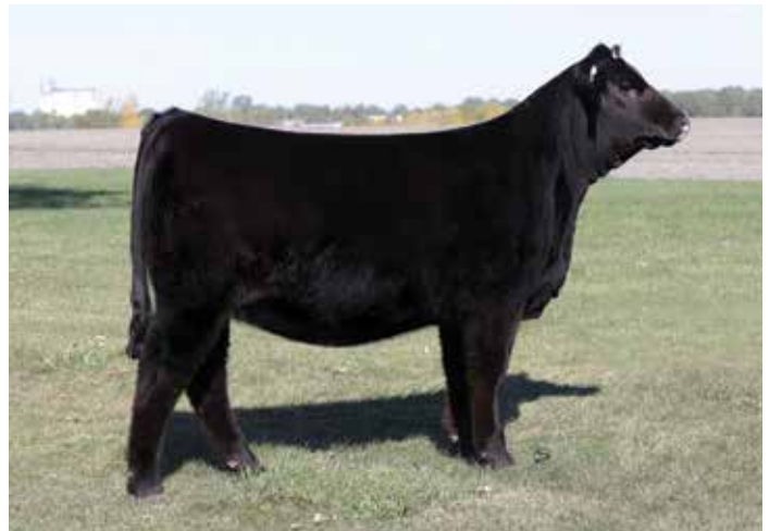
LOT 6 CCS / JS SUMMER 47K