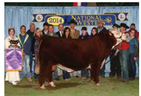
2014 NWSS Supreme Champion Hereford $600,000 Maternal Grand sire of Lot 39