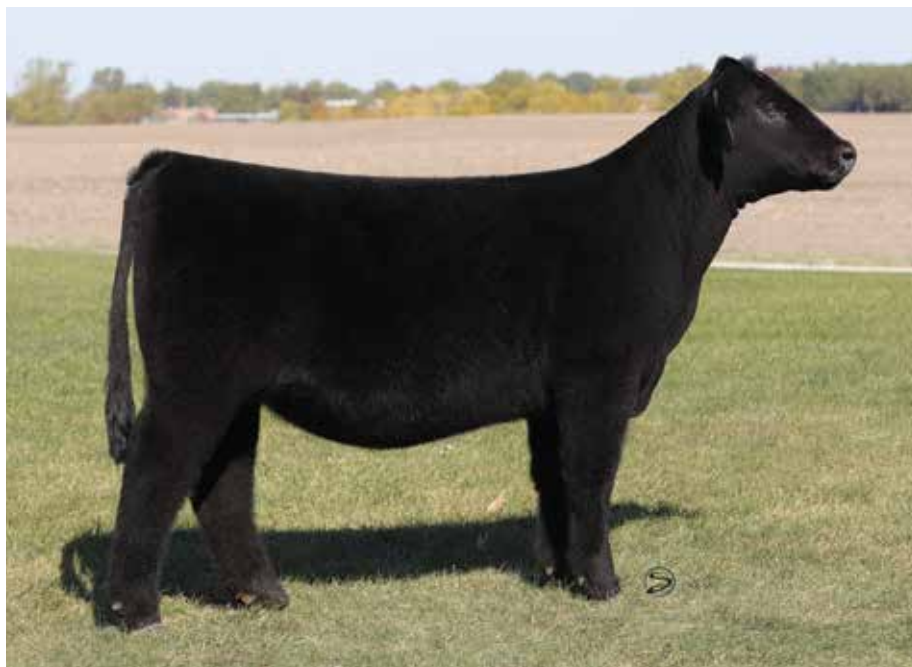
LOT 35 CCS ELLIE 204K

The influence of PVF Blacklist 7077 in the Angus business would be of popular notice on the tan bark and green shavings across the country. When he is used on donors like the 2018 NAILE Champion Angus Female, UDE Ellie 153E, that highlights the Angus donor lineup at JS, it takes his influence to the next level. This pair of full sisters are from the dominating Colburn Primo 5153 x SLL Ellie 2201 blend that continues to generate stock that are bold, massive, genuine built, and the high-quality kind. In 2020, a maternal sister to Ellie 153E was campaigned to be the NJAS Champion Owned Female as well as dominating the field at the NAILE Junior Angus Show to Champion honors as well for Sara Sullivan. In October at Udell Cattle Company, the "2201" craze continued as three daughters sold for $40,000, $38,000, and $30,000! The influence of this cow family is prevalent and significant within the elite of the elite of the Angus family and known for its substantial contribution to predictability and winning results. Mark the calendar for December 9, 2022, to make your investment into one of the best Angus cow families of today and beyond.