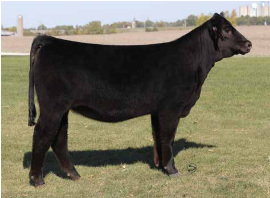
LOT 23 JS DAIRY QUEEN 41K

We like the impeccable lines and pattern they offer with the extra foot and bone as expected. They will rival the MR HOC Broker maternal sisters and who knows, they may best that friendly battle in the end. Buy with confidence and feed to your desired liking!