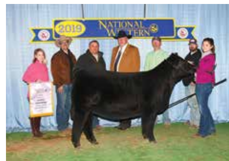
JBSF BIG MAMA 3F 2019 NWSS Reserve Grand Champion Simmental Heifer & Full Sister to Sire of Lot 8