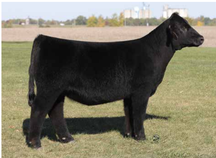
LOT 34 CCS ELLIE 205K