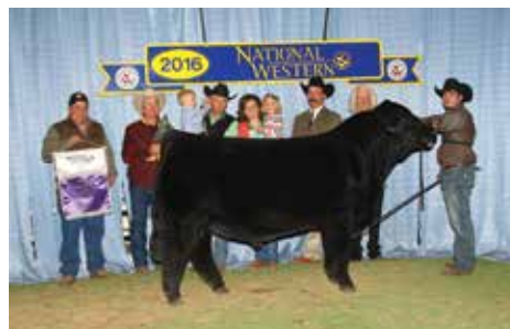
THSF LOVER BOY B33 Service Sire

AI BRED 5/1/22 TO THSF LOVER BOY B33 (ASA 2983443). PE 5/28/22-6/23/22 TO HOTZ-JABS HOLIDAY PAY 191G (ASA 3608283). LIKELY SAFE AI. ESTIMATED DUE 2/8/23.