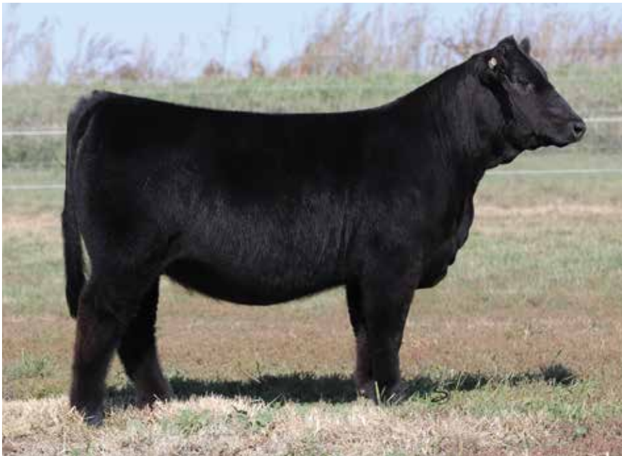
LOT 9 CCS/JS SUMMER 40K

ES Right Time FA110-4 was the sleeper herd sire prospect of the 2019 bull sale season. Bred by the Eichacker Family and selected by CK Cattle, two great seedstock operations that set out to use something a bit different. One of his first daughters was a crowd favorite at the Inaugural Cattleman's Congress and from there the rest is history, his semen has commanded top dollar when offered at auction and been placed in some of the best seedstock programs in the nation! The ES Right Time FA110-4 stock are typically big at the surface with great feet and bone, they are flexible on the go and offer shear base width and body. They are simply practical and highly functional. This duo from WHF Summer 365C would trend the same way in kind and build, but they come with extra goods in reference to density and substance. They are for the cattlemen and women with breeding programs and bull sales. They will generate the phenotype and numerical profile that ranchers will gravitate towards. Build your future with a foundation breeding piece from the "Summer" line!