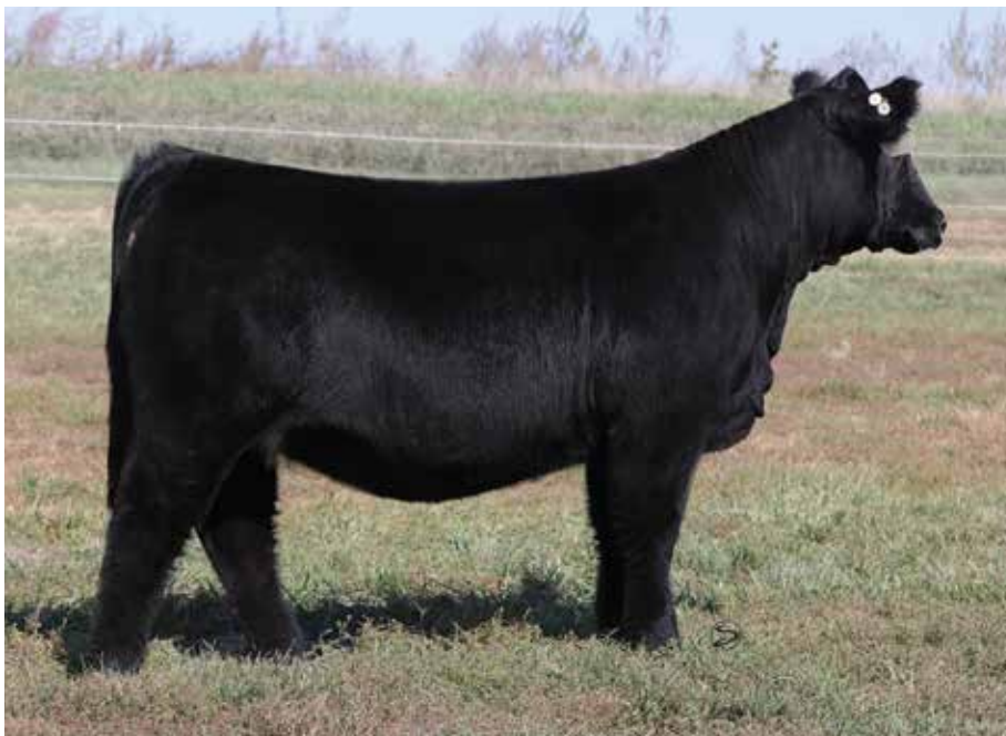
LOT 26 JS FLIRT AWAY 37K