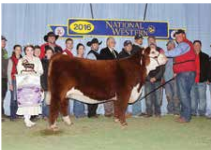
2016 NWSS Grand Champion Horned Hereford Heifer | Full Sister to Dam of Lot 39

The lone Hereford in this year's offering, but one thing that you can rest assured of is the quality of cow family and pedigree relevance that this beauty brings to the table! She is sired by the very popular T/R BPF American Classic 561C ET, a bull that has endured enormous success over the last two years via progeny dominance at the most competitive shows in North America. The dam side of her pedigree is stacked with just as much predictability. SULL TCC Diana 4068B is a full sister to countless National Champion females and a direct daughter of the National Champion TCC Ms Diana 01 that is sired by the $600,000 world-record selling C Miles McKee 2103 ET, the 2014 NWSS Supreme Champion Hereford.