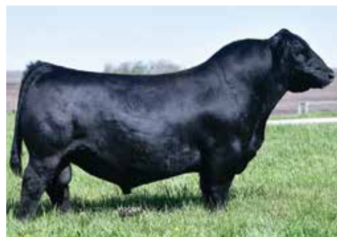
PVF BLACKLIST 7077 | Sire of Lots 34 & 35

The influence of PVF Blacklist 7077 in the Angus business would be of popular notice on the tan bark and green shavings across the country. When he is used on donors like the 2018 NAILE Champion Angus Female, UDE Ellie 153E, that highlights the Angus donor lineup at JS, it takes his influence to the next level. This pair of full sisters are from the dominating Colburn Primo 5153 x SLL Ellie 2201 blend that continues to generate stock that are bold, massive, genuine built, and the high-quality kind. In 2020, a maternal sister to Ellie 153E was campaigned to be the NJAS Champion Owned Female as well as dominating the field at the NAILE Junior Angus Show to Champion honors as well for Sara Sullivan. In October at Udell Cattle Company, the "2201" craze continued as three daughters sold for $40,000, $38,000, and $30,000! The influence of this cow family is prevalent and significant within the elite of the elite of the Angus family and known for its substantial contribution to predictability and winning results. Mark the calendar for December 9, 2022, to make your investment into one of the best Angus cow families of today and beyond.