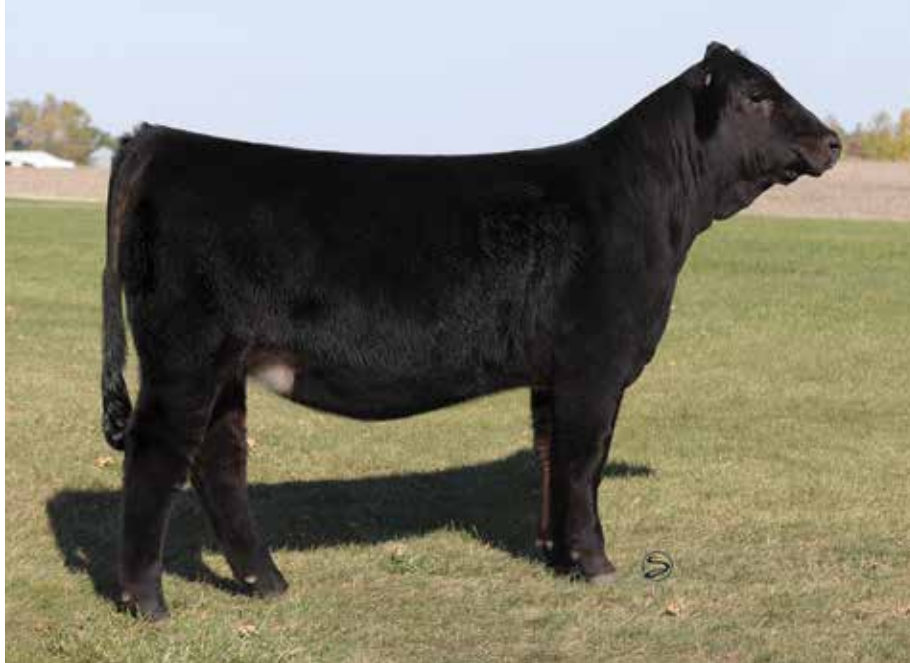
LOT 18 JS DAIRY QUEEN 45K

The quality and predictability of this mating is as true as any that have been made in Prairie City. The finished product, thus far, has yielded near textbook udder quality, excellent fertility, and longevity. Cattle from this mating are built with big, good feet, depth of heel, ideal center body, and all the muscle and power needed for good show stock and bullet proof beef production. This equation has been answered more than once with success, so why not invest in what is known and proven?!