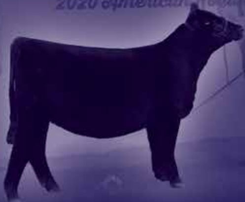
JS Dairy Queen 28H Full Sister to Lot 24