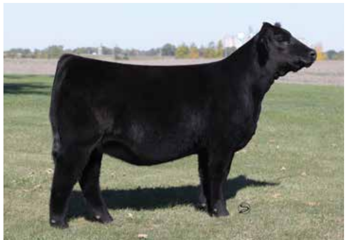
LOT 7 CCS / JS SUMMER 36K