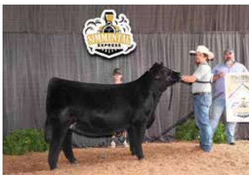
WHF ANDIE 368H | Full Sister to Lot 14