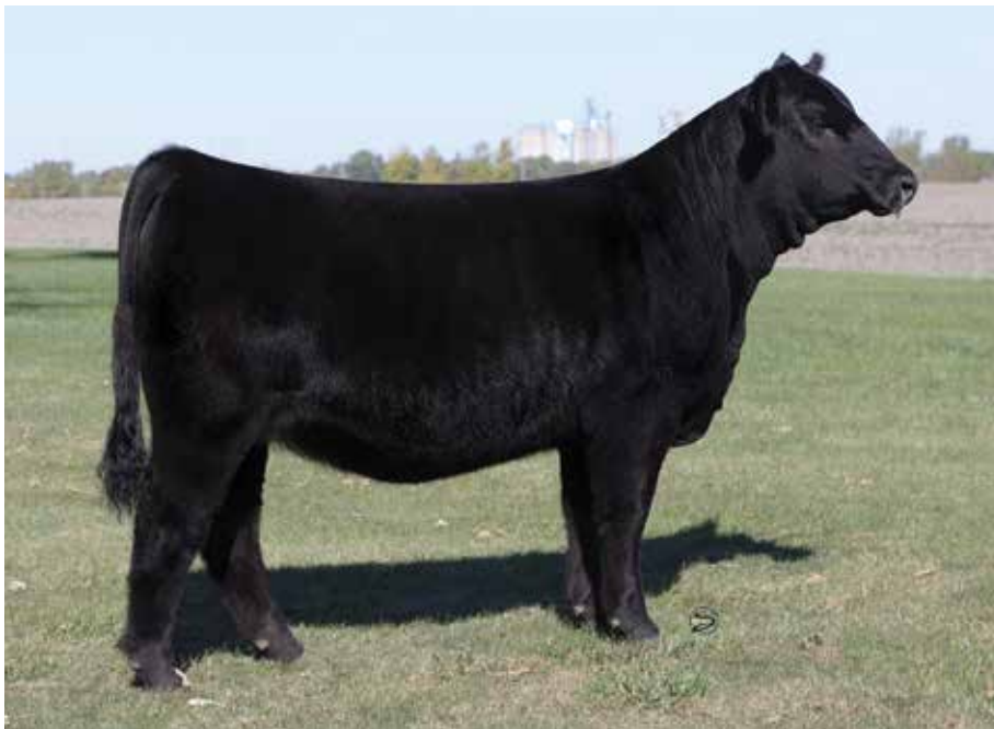
LOT 2 CCS/JS SUMMER 1K