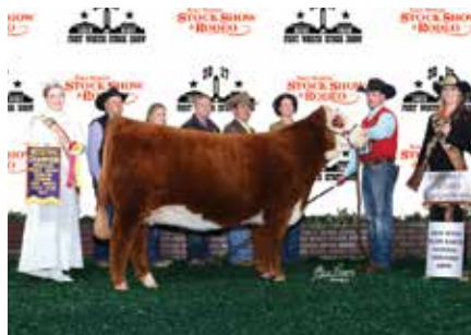
2017 FWSS Reserve Grand Champion Horned Hereford Heifer | Full Sister to Dam of Lot 39