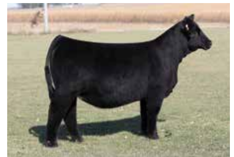
JS PEARL 37J | Maternal Sister to Lots 28 & 29