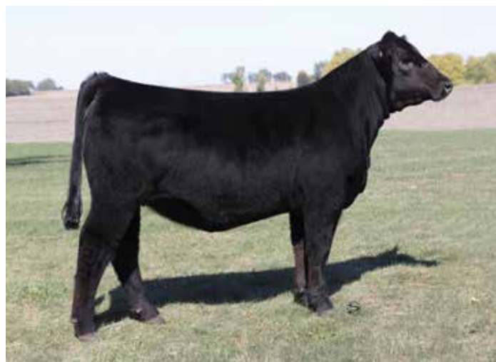
LOT 15 JS WHF ANDIE 465K

May we present another daughter of KCC1 Exclusive 116E from the famed WHF Andie 365A cow family. This gem includes the influence of the resident senior herdsire and many time SimGenetic Champion stud, CDI Innovator 325D. The influence of CDI Innovator 325D within the breed and this program is readily known. The cattle come with extra extension, flexibility, skeletal integrity, and in most cases improved number profiles. We find this to be one of the many intriguing combinations in the offering from a genetic perspective and her quality will catapult her onto many shortlists by those that make the visit to Prairie City on or prior to December 9!