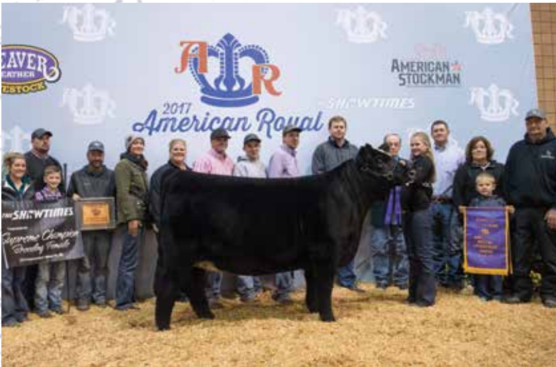
WHF Summer 365C | 2017 American Royal Supreme Champion Female