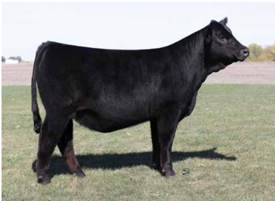
LOT 19 JS DAIRY QUEEN 33K