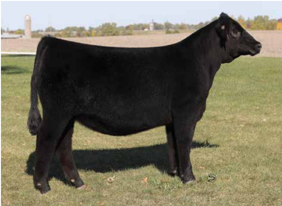
LOT 29 JS PEARL 52K

Lot 29 is the lone SimGenetic piece of this cow family up for grabs on Friday evening December 9, 2022. Without hesitation, her pedigree alone should rightfully launch her towards the top end of the percentage offering on most "short lists" sale day. The added hair, look, smoothness, and balance is evident here and certainly one to take notice of from the future matriarch herself, known as "Pearl".