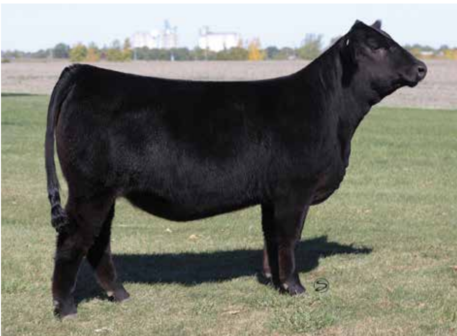
LOT 21 JS DAIRY QUEEN 32K

Here is a sister duo sired by the 2021 Reserve National Champion Simmental Bull at the Cattleman's Congress, WHF/JS/CCS Double Up G365. "Double Up" has experienced heavy use in the breeding box with the weighted average on the heifer side. Most have experienced true calving ease with blended eye appeal, balance, and desirable shape as the end result. This is a very potent and dense mating in terms of total lineage value related to the JS program. When combined in a pedigree, WHF Summer 365C and CLRS Dairy Queen 606D, have propagated some of the highest valued and critically acclaimed stock that this program has generated over the past few years. It is only in an intensely managed embryo transfer program such as JS Simmentals does one find opportunities like this to latch onto. The stock is an elite representation of extra length, true shape, bone, and quality at the surface, just as one would expect. Set the satchel down and study the lesson that is before you with serious consideration!