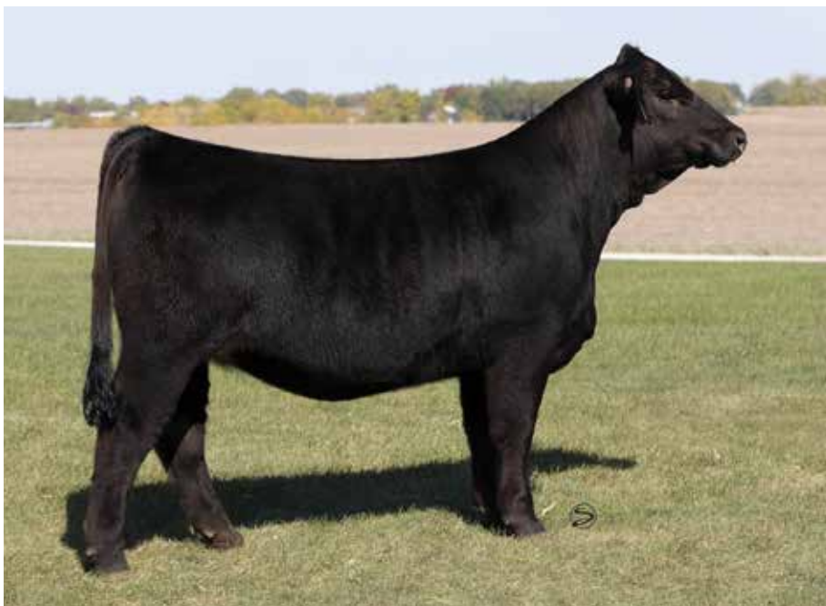
LOT 3 CCS/JS SUMMER 3K

With this duo of sisters, one gathers two shots of the good stuff from the "Summer" cow family and the influence of the other influential, young donor in the battery at JS Simmentals known as CLRS Dairy Queen 606D. They are sired by the XTB resident herdsire known as JS Keepin It 90 39H. He is a very athletic, long sided, good-looking stud in his own right. As one would expect, these females have those very important attributes in substance, length, look, and center body shape. We expect big things from this mating, as we see this genetic blend offering both tan bark and real-world advantages in kind and on paper!