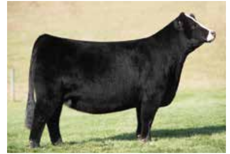
JS PEARL 37E | Dam of Lots 28 & 29

Here is a pair of maternal sisters from the same great cow family as the preceding lots in the offering. JS Pearl 37E would be one of the better full sisters to the legendary "Boots" female in production. The Liggett family have been long time investors and friends of the program, with loyalty at the top of their list. "Pearl" has generated two-fold for them in a short period of time and we would expect that the way these two females are sired, they will do the same for whomever decides to invest.