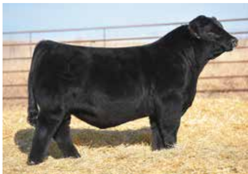
KCC1 EXCLUSIVE 116E | Sire of Lot 14 & 15

May we present another daughter of KCC1 Exclusive 116E from the famed WHF Andie 365A cow family. This gem includes the influence of the resident senior herdsire and many time SimGenetic Champion stud, CDI Innovator 325D. The influence of CDI Innovator 325D within the breed and this program is readily known. The cattle come with extra extension, flexibility, skeletal integrity, and in most cases improved number profiles. We find this to be one of the many intriguing combinations in the offering from a genetic perspective and her quality will catapult her onto many shortlists by those that make the visit to Prairie City on or prior to December 9!