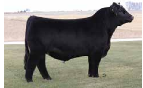
CCS/JS DOC 48H | Full Brother to Lots 51 & 52