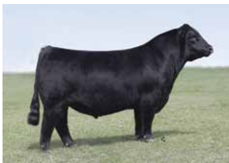
JBSF LOGIC 5E Sire of Lot 8