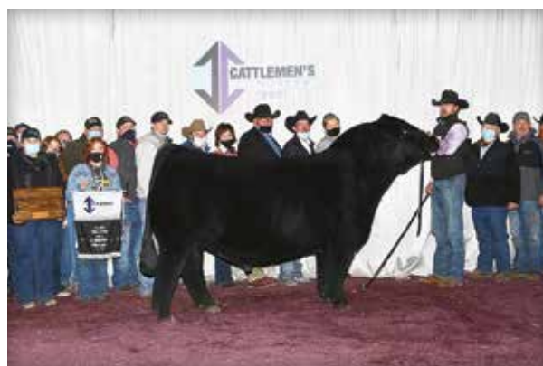
SO REMEDY 7F | $530,000 Sire of Lot 26

PE 4/12/22-7/13/22 TO RUBYS NIGHT WATCH 986G (ASA 3594816) & RUBYS NIGHT WATCH 978G (ASA 3594822)