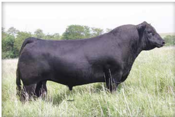
WAGR DRIVER 706T | Sire of Lot 12