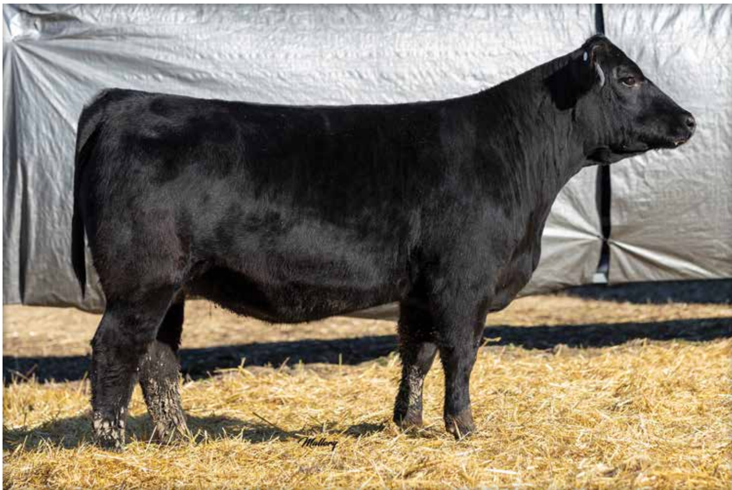
LOT 33 MOORE DEPLORABULLS QUEEN 55J