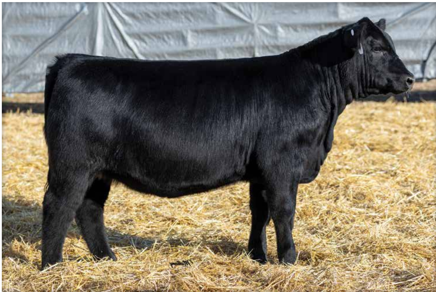
LOT 3 MOORE REMEDY HOPE 47K