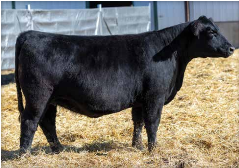
LOT 47 MOORE SANDYS CLASS 165H