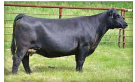
LAZY H BAR FOREVER LADY 361 Member of the famous "5001" cow family!