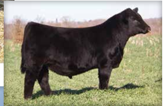
SCHOOLEY ELI 434B | Sire of Lot 9