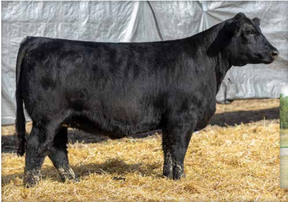
LOT 28 MOORE PLAYMATES DAUGHTER 151H