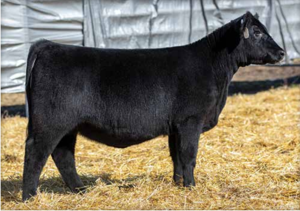
LOT 22 MOORE LADY CLASS 87K