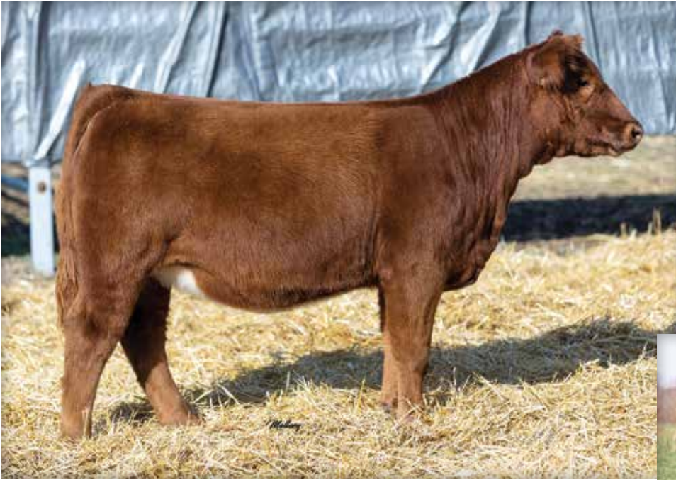
LOT 9 MOORE CAYENNE 56K