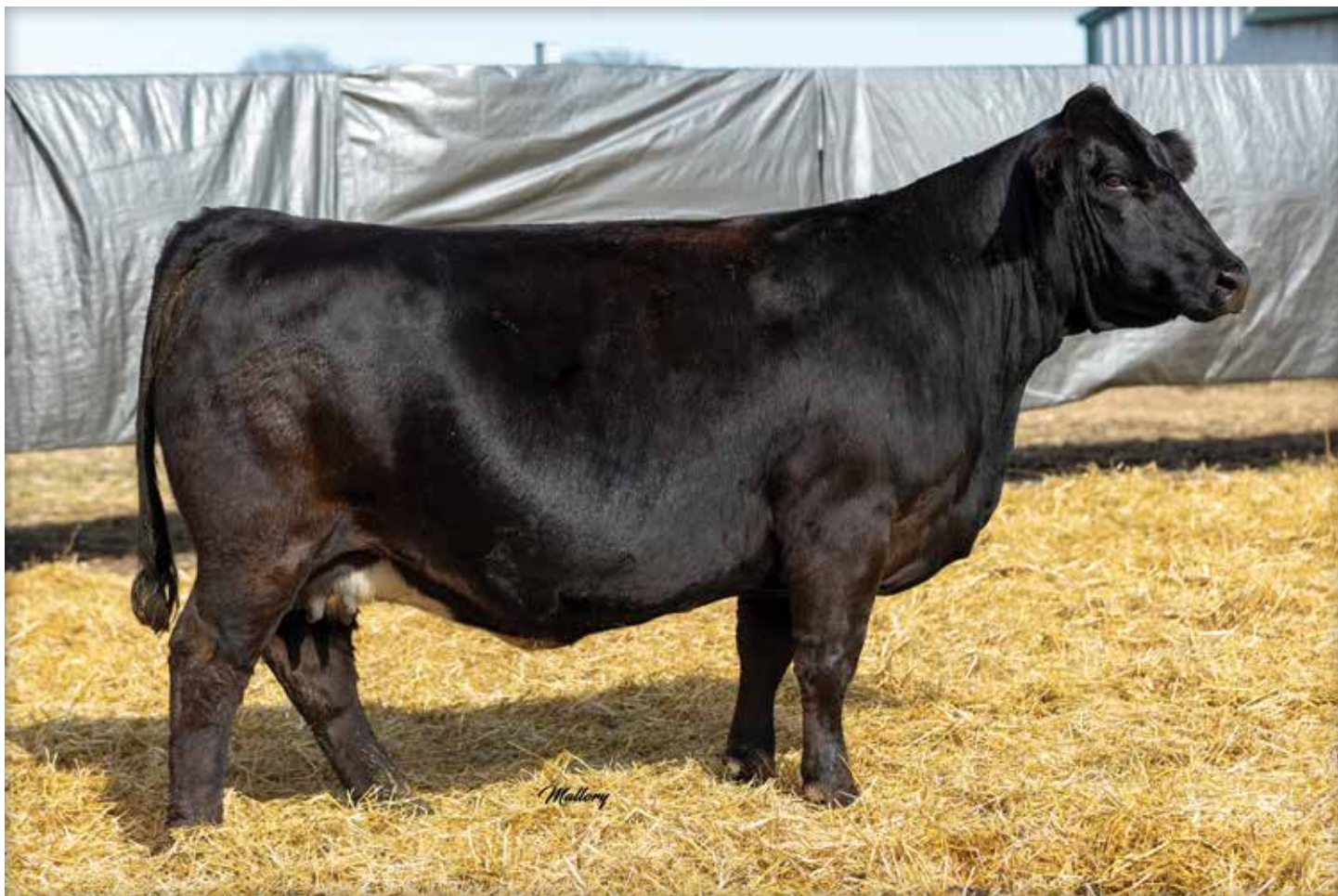
LOT 49 MOORE VALARIE 25C