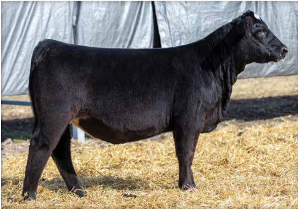
LOT 7 MOORE KELLY 49K