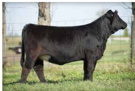
RUBY NFF RHYTHM 975G | Dam of Lot 32