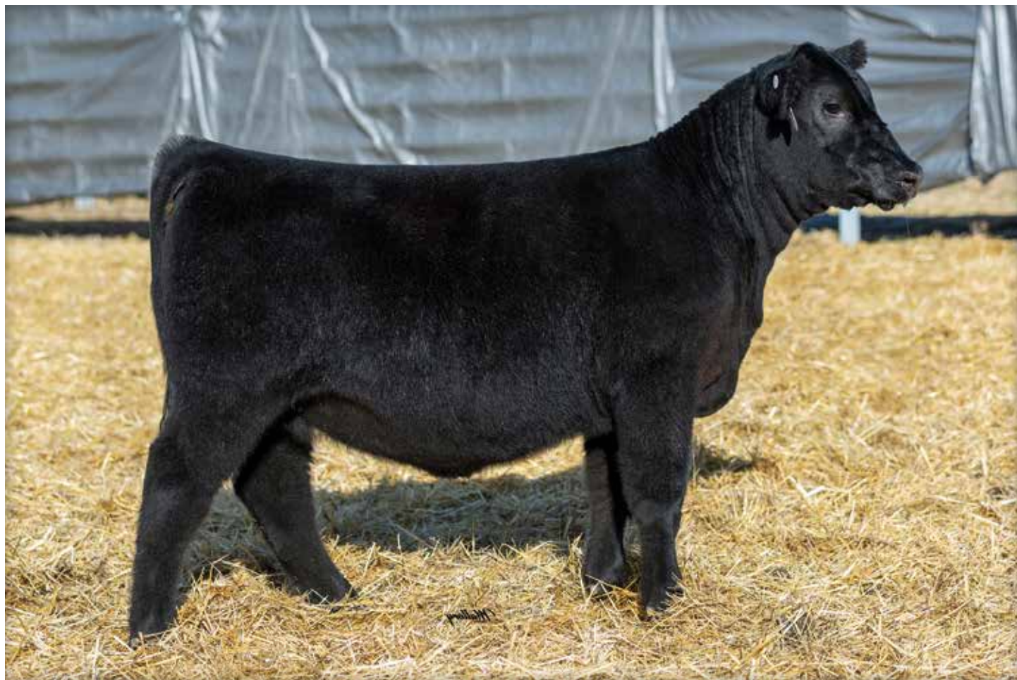
LOT 21 MOORE CLASSY LADY 78K