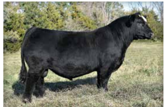
W/C FORT KNOX 609F | $180,000 Sire of Lot 4