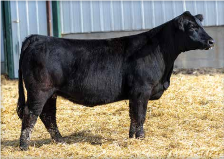
LOT 34 MOORE PROFITS QUEEN LUCY 75J