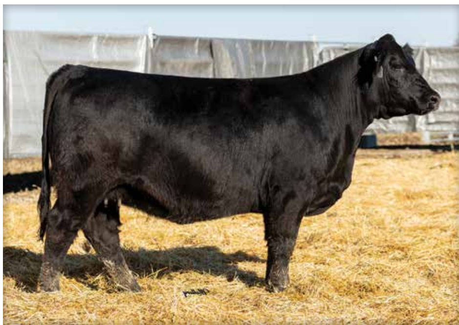
LOT 46 MOORE HELLEN 162H