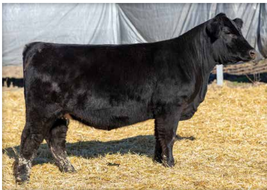
LOT 42 MOORE JADE 137J

Another big bodied, sound brood cow in the making. PE 4/16/22-7/13/22 TO RUBYS NIGHT WATCH 986G (ASA 3594816) & RUBYS NIGHT WATCH 978G (ASA 3594822)