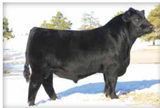
DAMERON FIRST CLASS | Sire of Lots 21-23