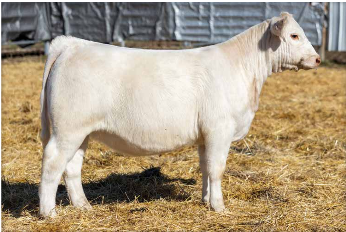
LOT 15 MOORE MS WHITE WATER 51K