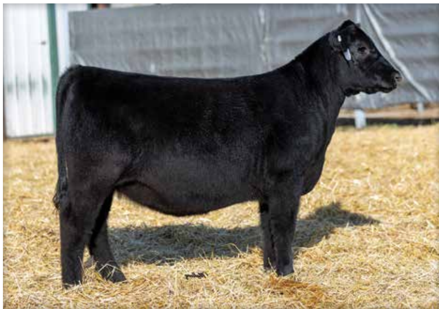
LOT 24 MOORE KATY 48K