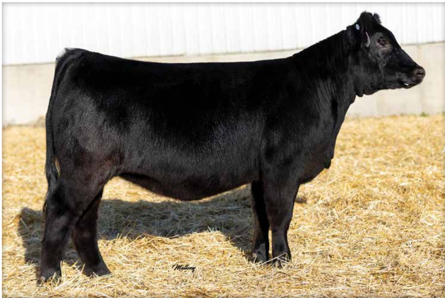
LOT 1 MOORE HAILEY 3K