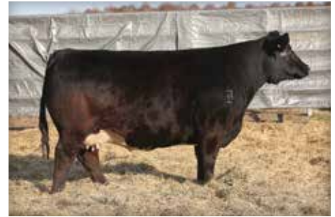
RYAN QUEEN LUCY C796 | Dam of Lots 7 & 8