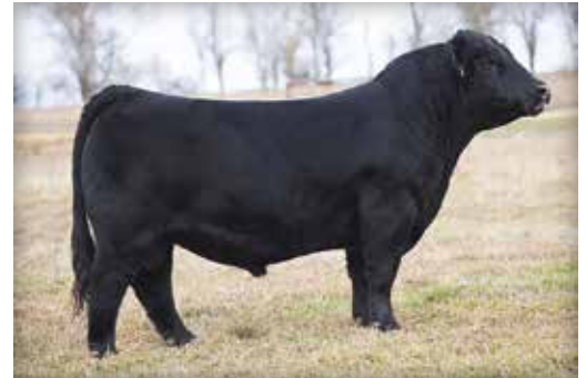
PROFIT | $400,000 Sire of Lot 34 & 35