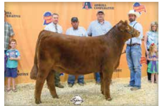
CAG MS SATANA 278F ET | Dam of Lot 14