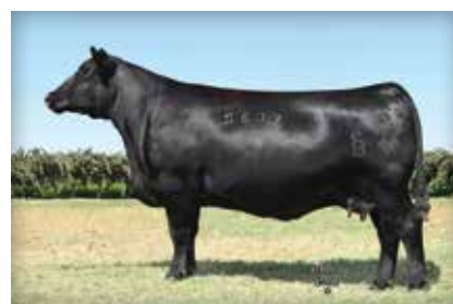
EXG SARAS DREAM S609 R3 Famous 3rd Generation Dam of Lot 25

24 MOORE KATY 48K BD: 4/12/22 REG: 20481338 TATTOO: 48K