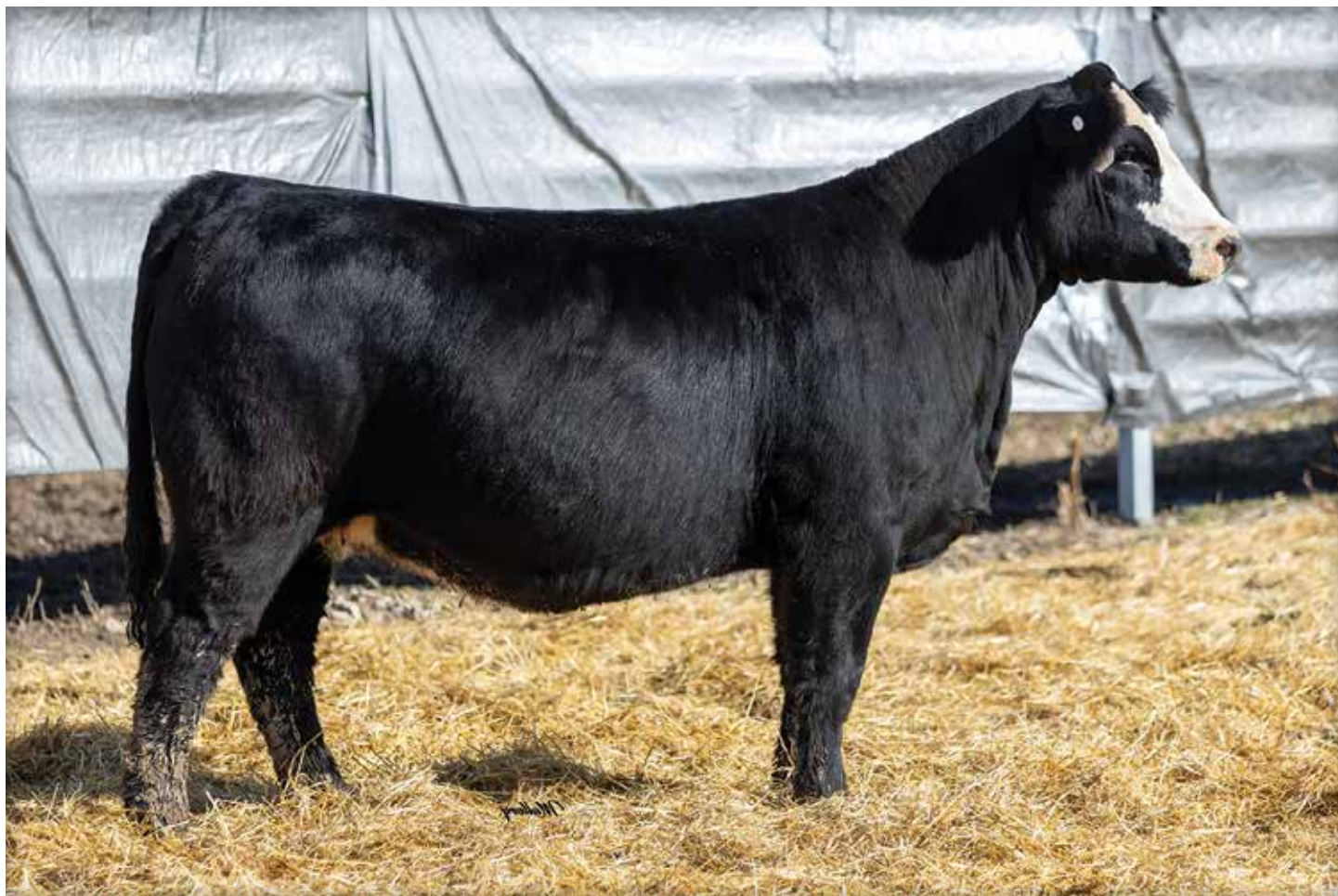
LOT 43 MOORE STONEHENGE REBA 123H