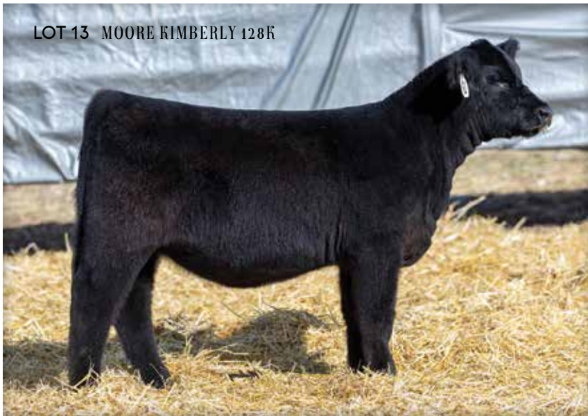
LOT 13 MOORE KIMBERLY 128K