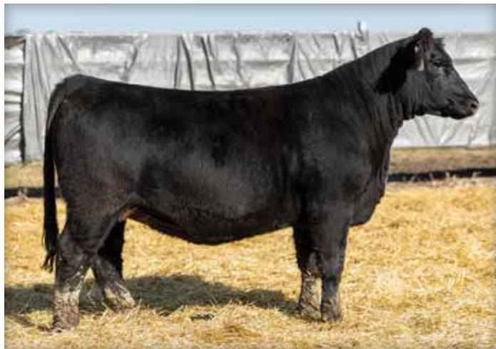
LOT 30 MOORE FORT KNOX DESIRE 168H

PE 4/12/22-7/13/22 TO RUBYS NIGHT WATCH 986G (ASA 3594816) & RUBYS NIGHT WATCH 978G (ASA 3594822)