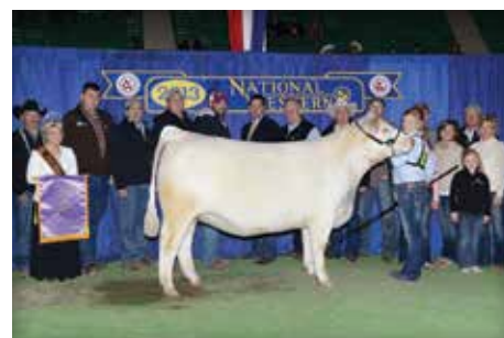
TR PZC NC FIRE FLY 1746 | 2013 NWSS Grand Champion Charolais Heifer and Full Sister to Dam of Lots 15-17

16 MOORE PEARL 62K BD: 3/29/22 REG: EF1327315 TATTOO: 62K