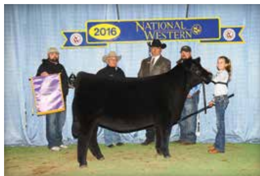
DAF REBA C85 | 2016 NWSS Grand Champion Percentage Simmental Heifer and Full Sister to Lot 43

PE 4/11/22-7/13/22 TO RUBYS NIGHT WATCH 986G (ASA 3594816) & RUBYS NIGHT WATCH 978G (ASA 3594822)