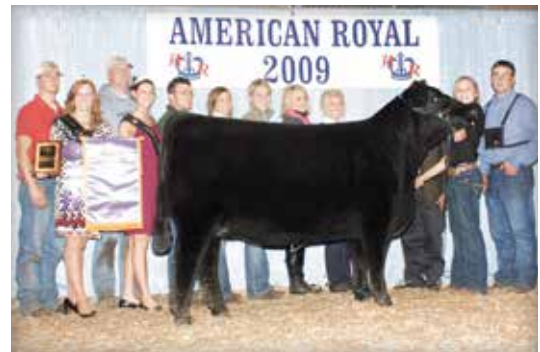
K N C CABIN CREEK SANDY 804 | Matriarch Donor Dam

SILVEIRAS STYLE 9303 SILVEIRAS S SIS SANDY 3344 K N C CABIN CREEK SANDY 804