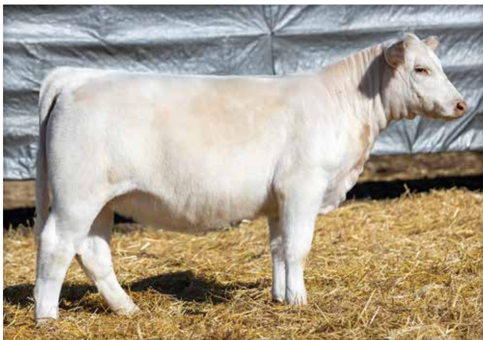
LOT 17 MOORE ANNA 57K