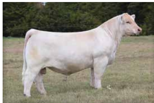
CCC WC REDEMPTION 7143 PLD ET | $85,000 Sire of Lot 15