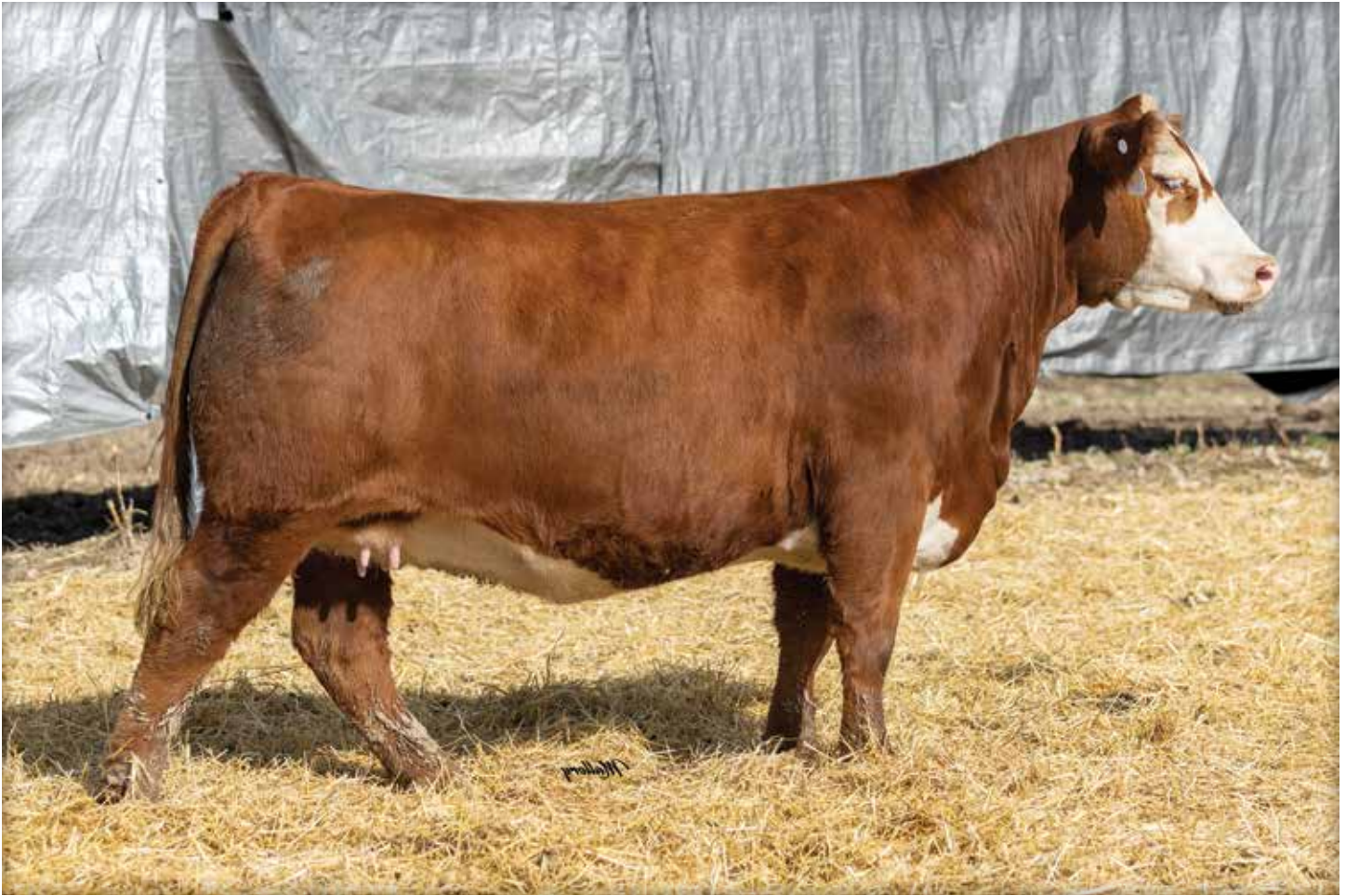
LOT 44 MOORE JUST RIGHT 148H