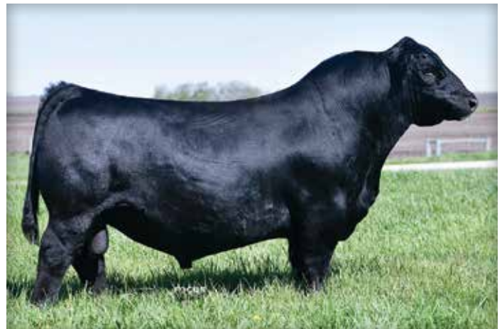
PVF BLACKLIST 7077 | Sire of Lot 20

DAMERON FIRST CLASS MOORE FOREVER CLASSY 106B LAZY H BAR FOREVER LADY 8143