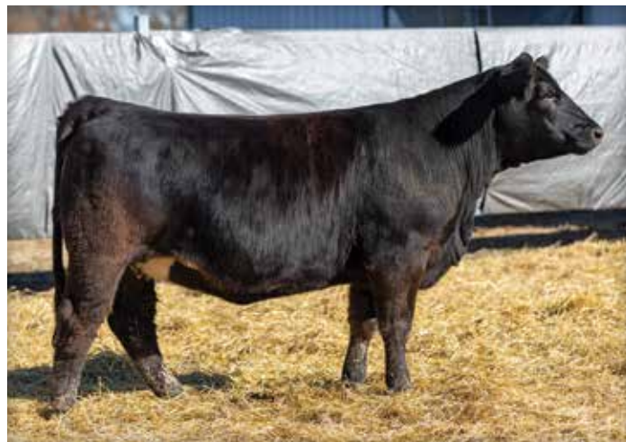
LOT 31 MOORE DESIRES CURRENCY 20J

PE 4/12/22-7/13/22 TO RUBYS NIGHT WATCH 986G (ASA 3594816) & RUBYS NIGHT WATCH 978G (ASA 3594822)