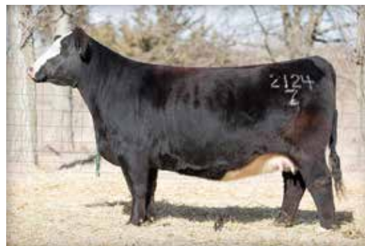
RUBY NFF RHYTHM 2124Z | Maternal Granddam of Lot 32