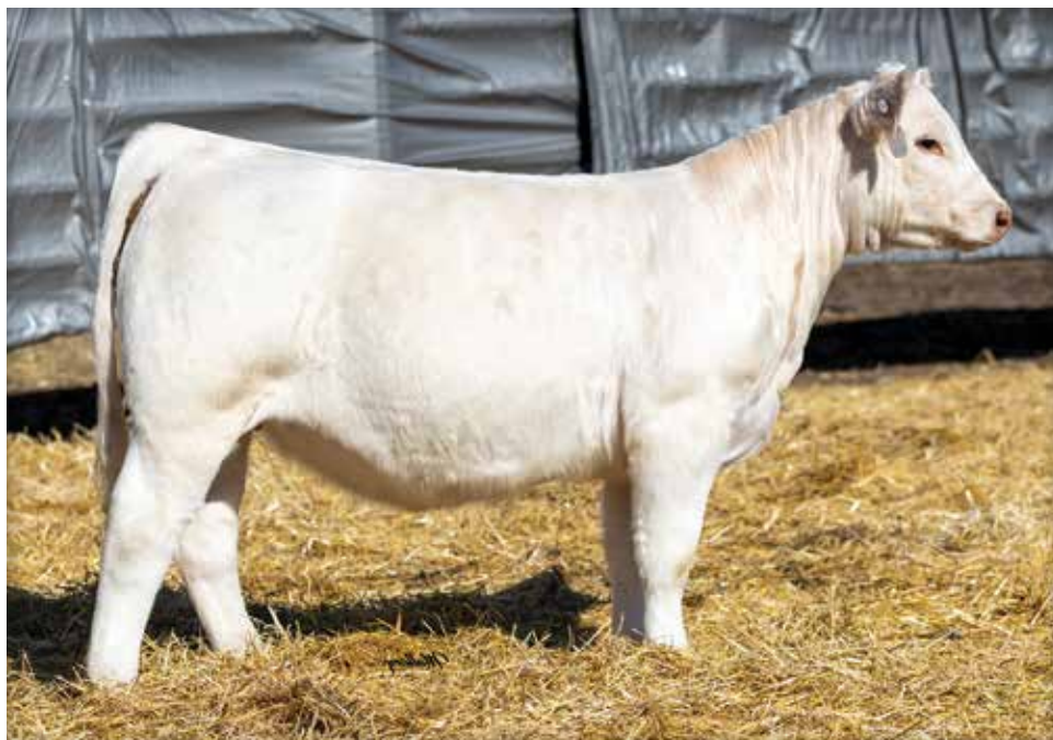
LOT 16 MOORE PEARL 62K