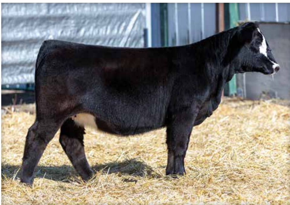
LOT 6 MOORE KENZIE 95K