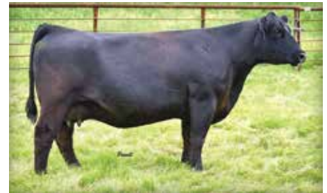
LAZY H BAR FOREVER LADY 317 Member of the famous "5001" cow family!