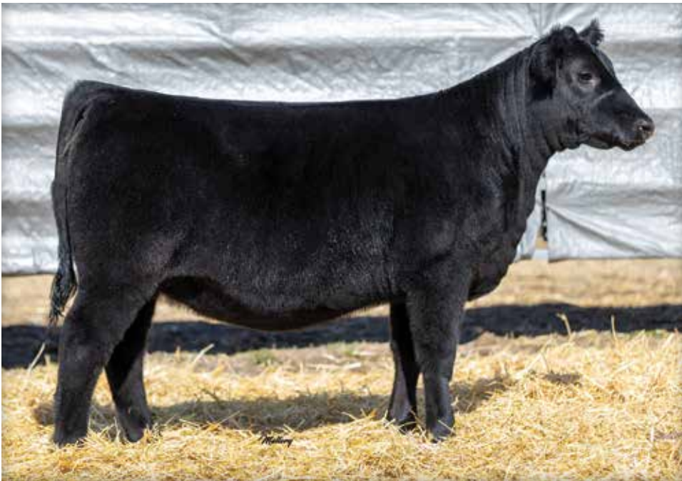
LOT 23 MOORE FOREVER CLASSY 63K