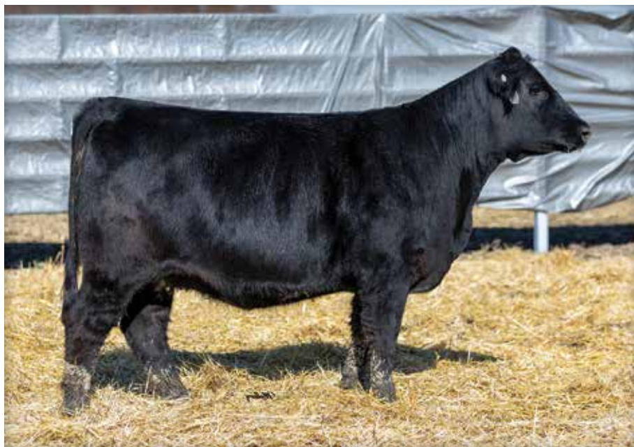
LOT 39 MOORE JUNO 77J