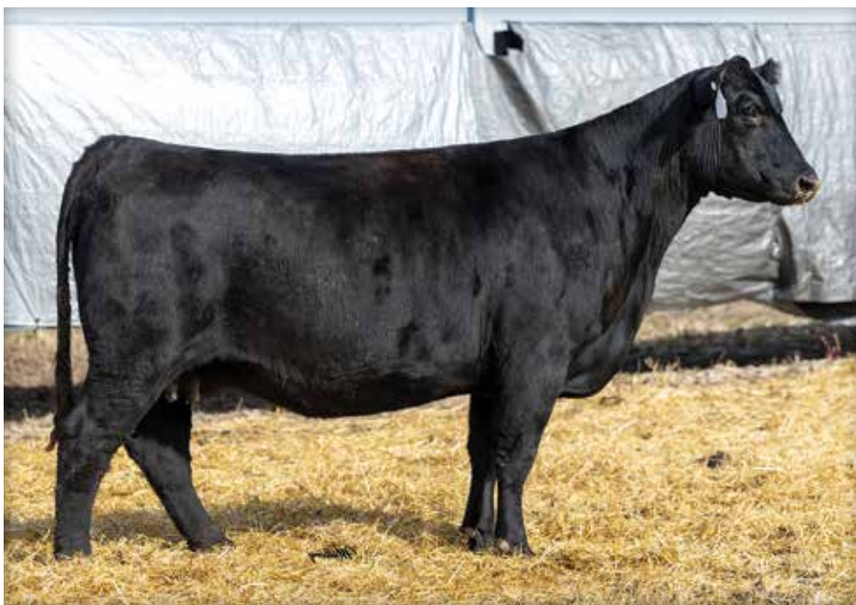
LOT 48 MOORE MS SENSATION 5F