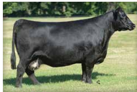
SILVEIRAS S SIS SANDY 2355 Full Sister to Dam of Lot 47