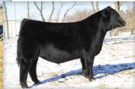
RUBY'S CURRENCY 7134E $435,000 Sire of Lots 5 & 6