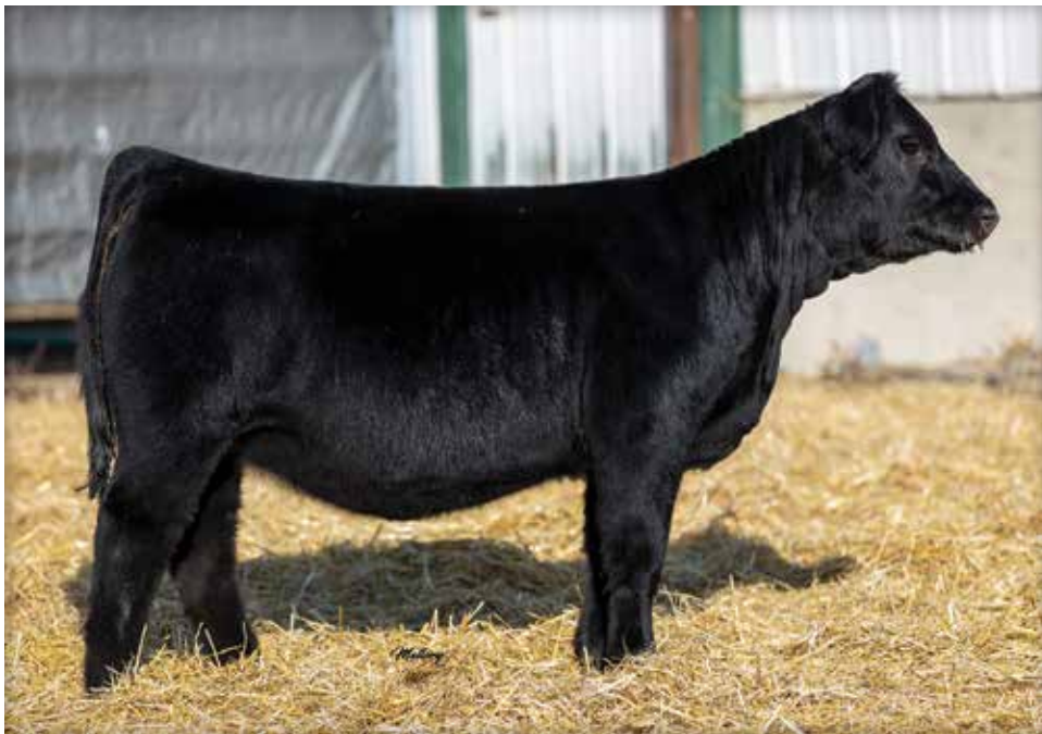
LOT 8 MOORE FORTUNES QUEEN 39K