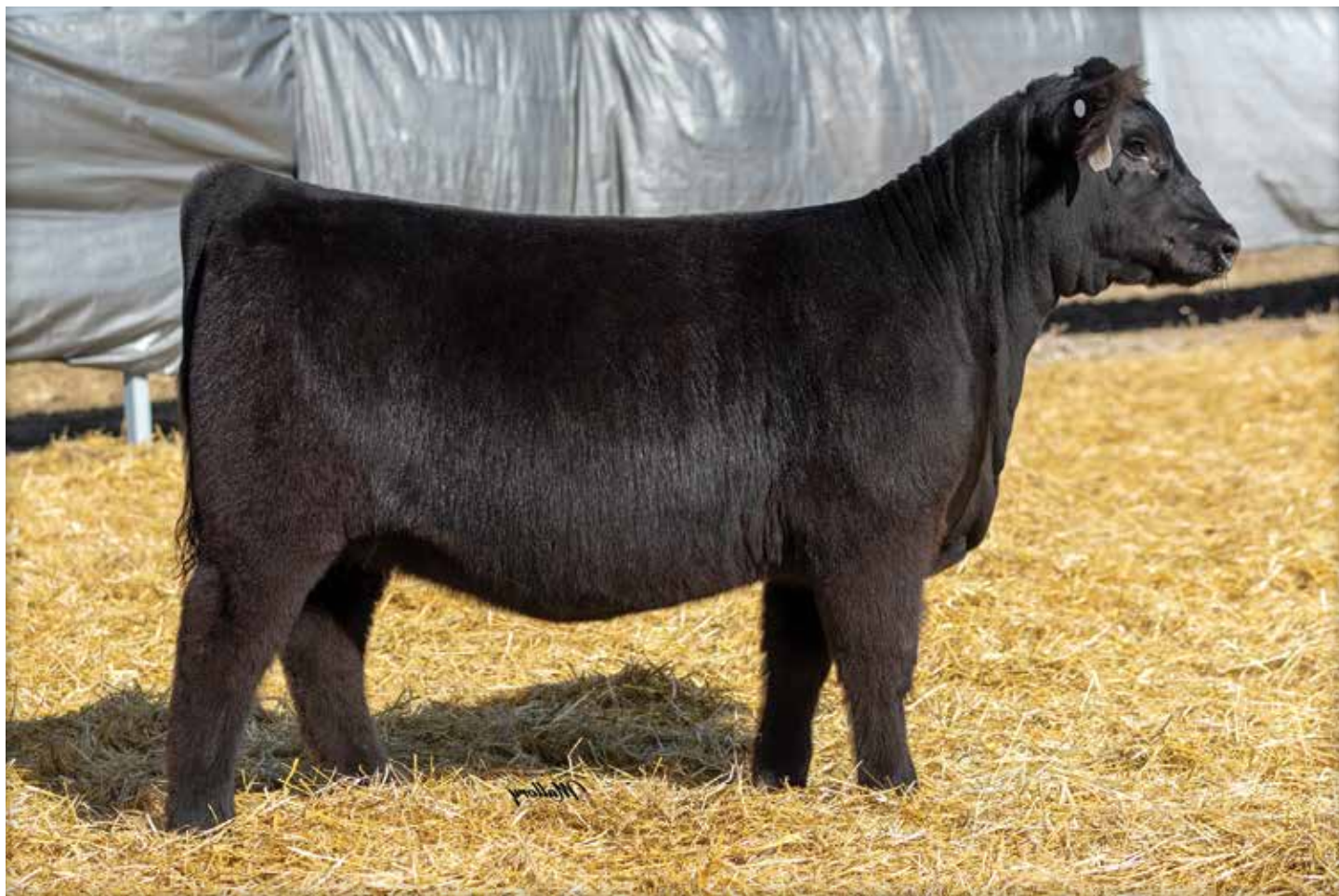
LOT 18 MOORE KALI 13K