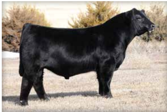
W/C RELENTLESS 32C | Famous Maternal Brother to Lot 1