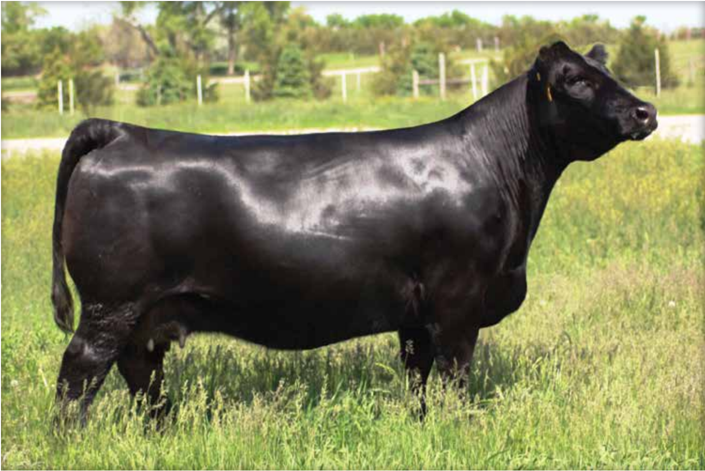
MISS WERNING KP 8543U | Famous Dam of Lot 1