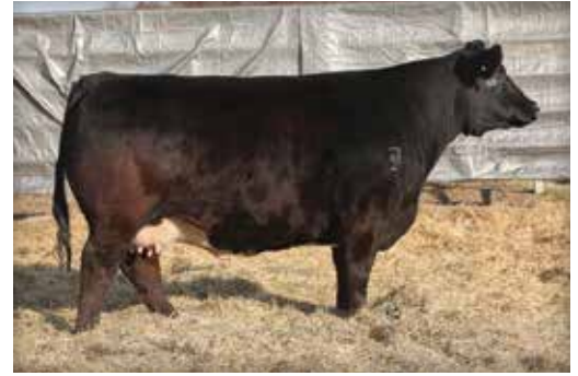
RYAN QUEEN LUCY C796 | Dam of Lots 33-35