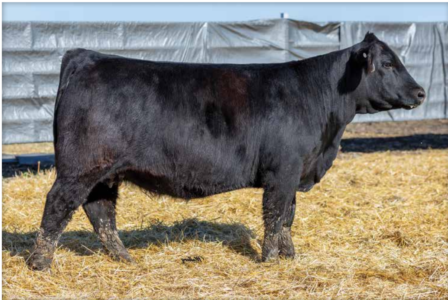
LOT 26 MOORE JOLENE 3J