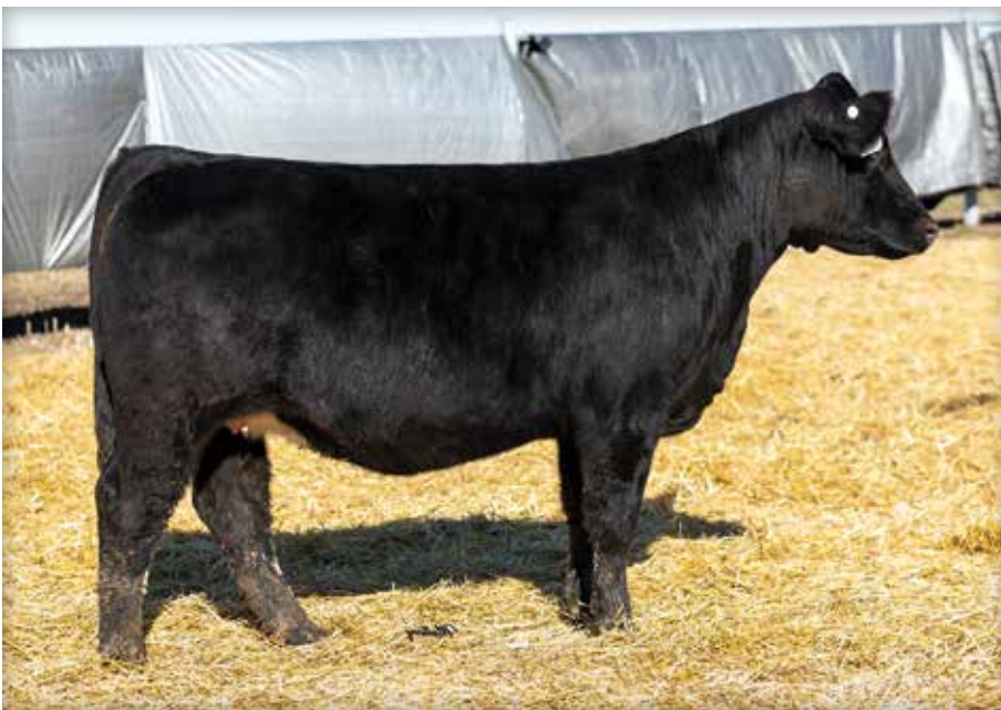
LOT 37 MOORE MISS DOMINANCE 92J