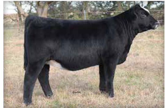
WAGR PLAYMATE 438A | Dam of Lots 4-6