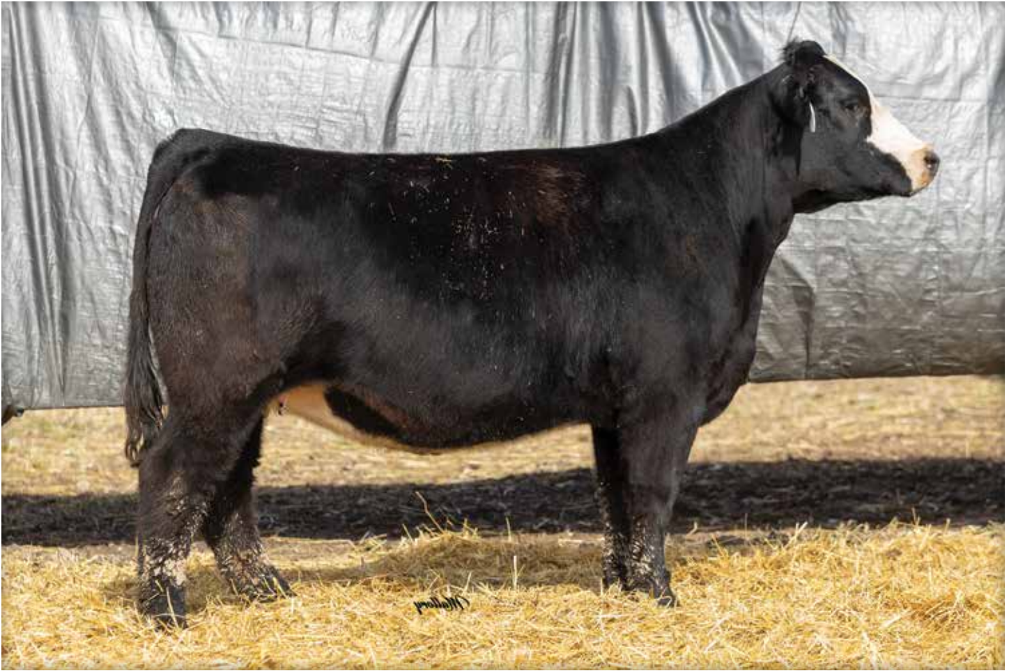
LOT 27 MOORE HONEY 149H