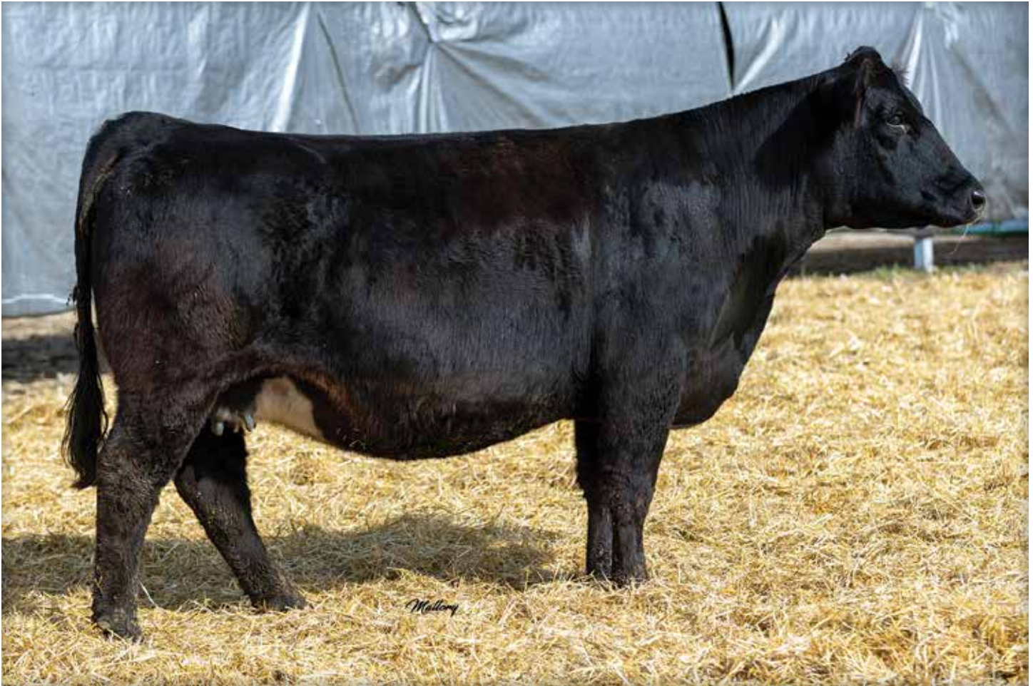
LOT 50 MOORE BELLA 67F