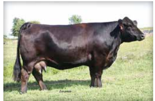
GCF MISS CALIENTE | Maternal Granddam of Lot 37