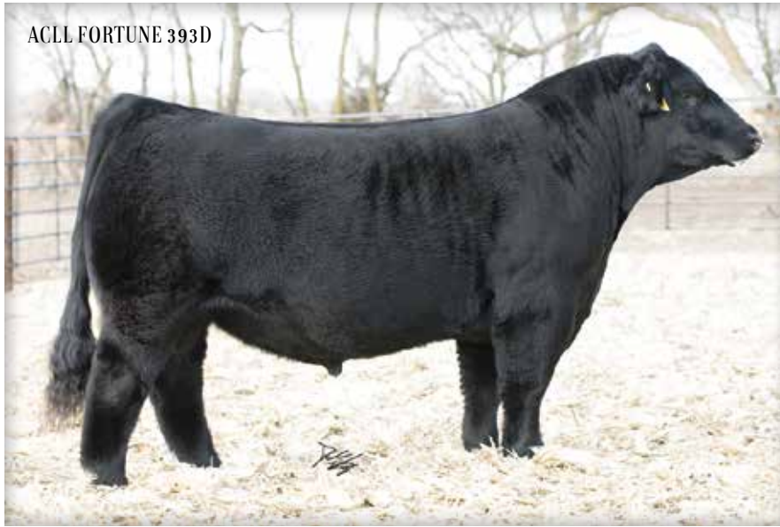
ACCL FORTUNE 393D