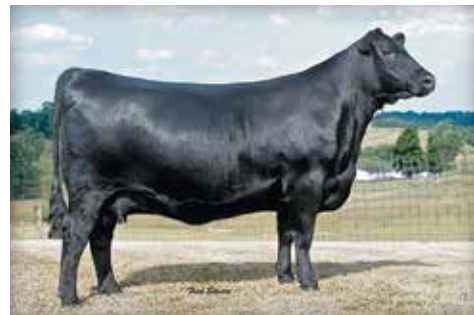
CHAMPION HILL GEORGINA 4413 Maternal Sister to Dam of Lot 48