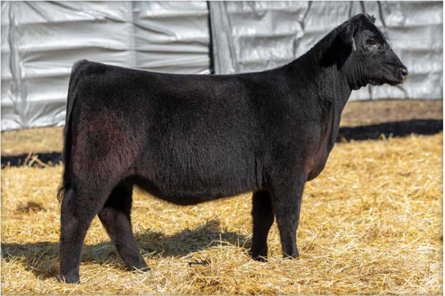
LOT 19 MOORE KAT 67K