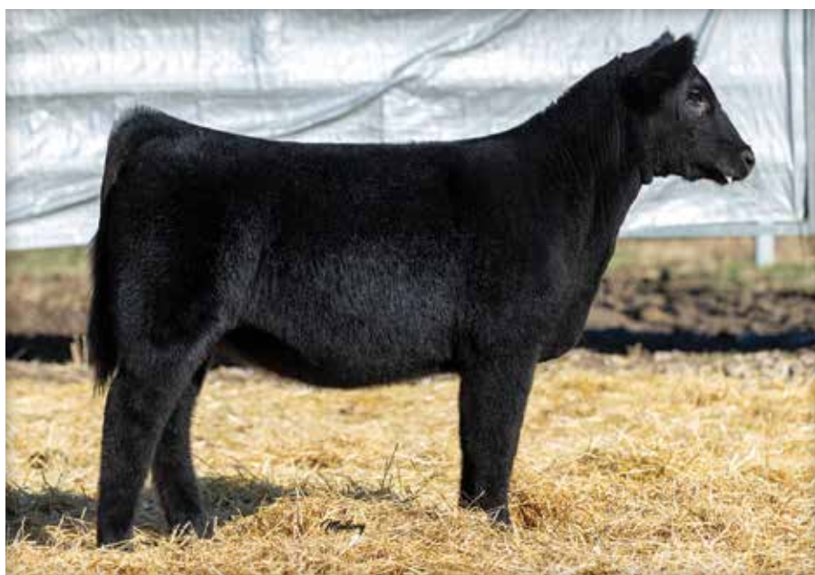
LOT 25 MOORE GINA 145K