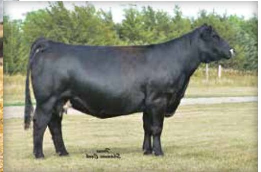
WAGR LULLABY 703T Maternal Granddam of Lots 26-30