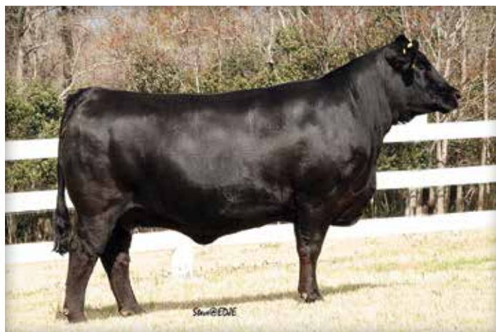
SWAIN VELVET 607S | Dam of Lot 49