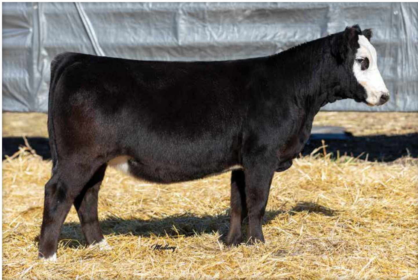
LOT 12 MOORE CINDY 80K