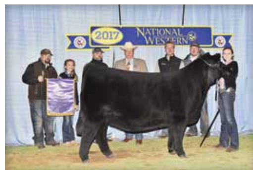
DAF REBA C707 | 2017 NWSS Grand Champion Percentage Simmental Heifer and Full Sister to Lot 43