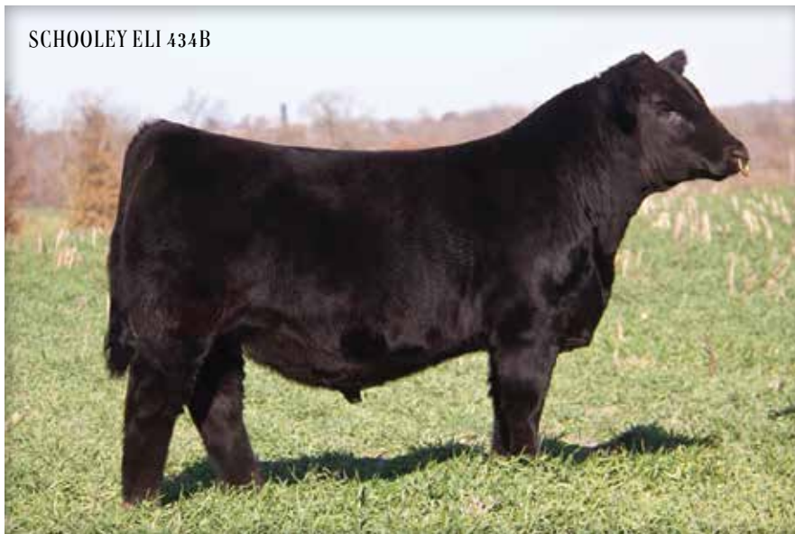
SCHOOLEY ELI 434B