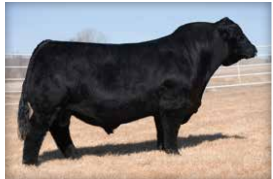
TL LEDGER | $250,000 Full Brother to Dam of Lot 11