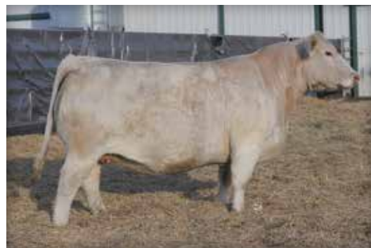
TR MS BRYLOR 4766 ET | Dam of Lots 15-17

TR MR FIRE WATER 5792R ET TR MS BRYLOR 4766 ET THOMAS MS IMPRESSIVE 0641