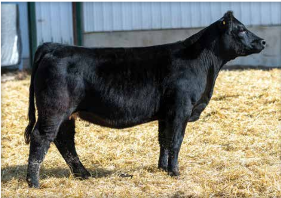
LOT 35 MOORE PROFITS QUEEN 85J