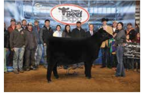
LAZY H BAR FOREVER LADY 528 Member of the famous "5001" cow family!