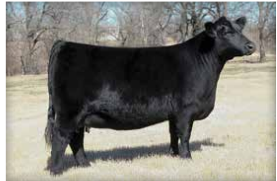
CONLEY SANDY 5104

Famous Member of the K N C Cabin Creek Sandy 804 cow family!