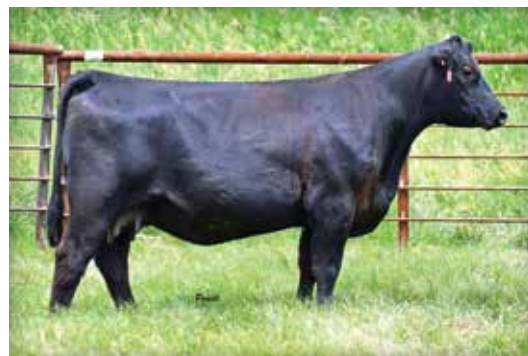
LAZY H BAR FOREVER LADY 580 | Full Sister to Dam of Lot 21-23

EXAR LUTTON 1831 LAZY H BAR FOREVER LADY 8143 LAZY H BAR FOREVER LADY 5001