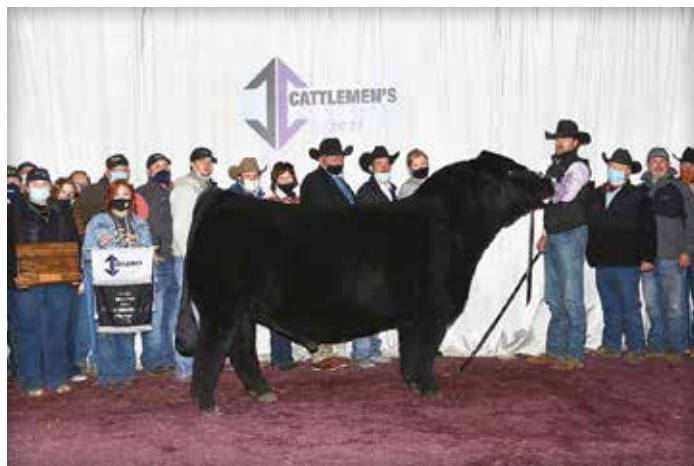
SO REMEDY 7F | $530,000 Sire of Lots 1-3