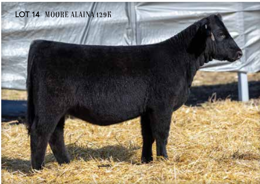
LOT 14 MOORE ALAINA 129K