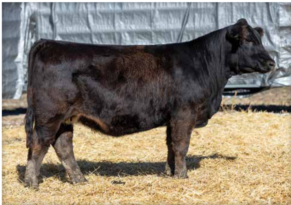
LOT 45 MOORE JAZMIN 125J