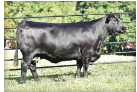
MOORE SHELBY 283Y | Full Sister to Dam of Lot 13