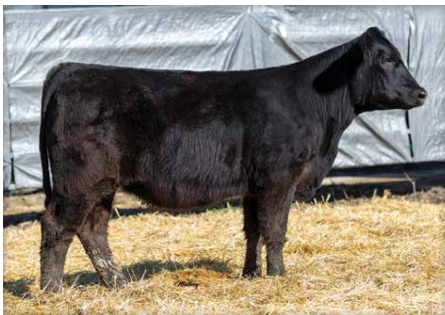
LOT 40 MOORE STONEHENGE KISS 99J