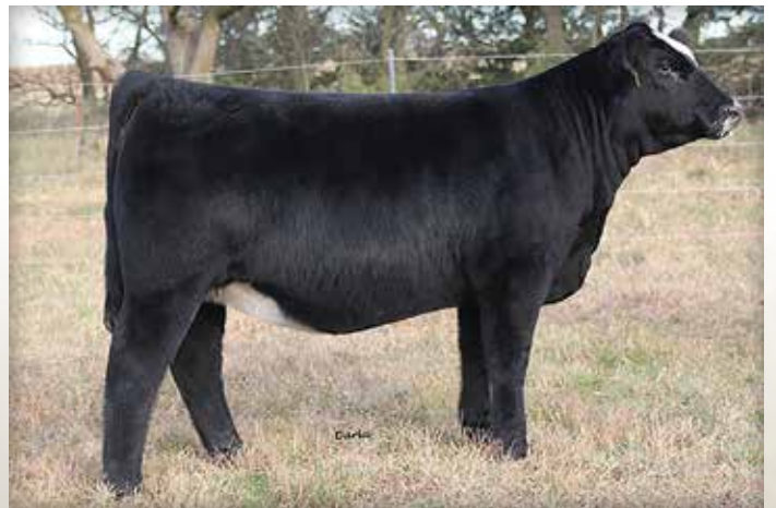
WAGR PLAYMATE 438A | Dam of Lots 26-29

PE 4/11/22-7/13/22 TO RUBYS NIGHT WATCH 986G (ASA 3594816) & RUBYS NIGHT WATCH 978G (ASA 3594822)