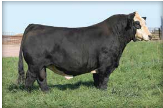
W/C BANKROLL 811D | $205,000 Maternal Brother to Lot 1