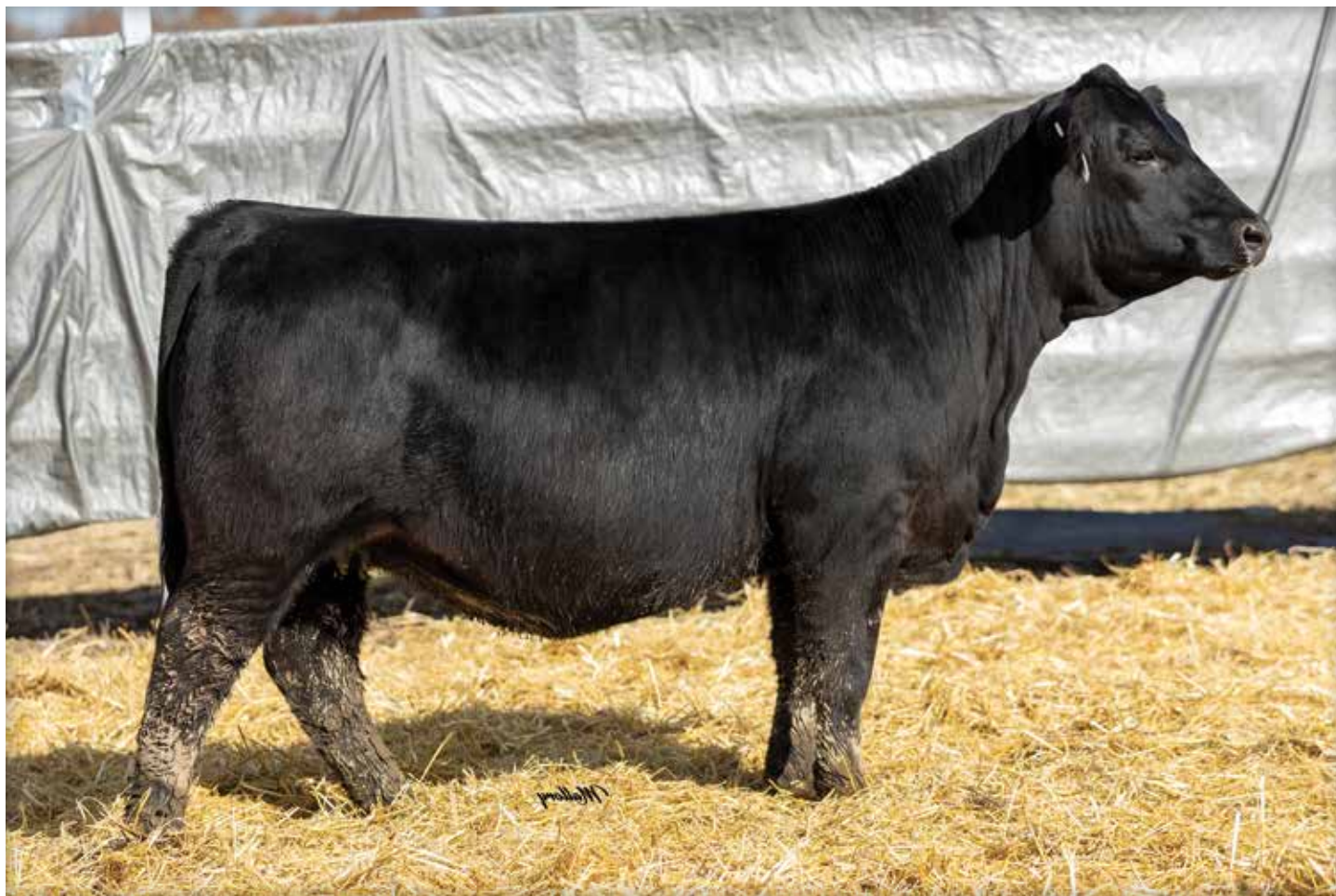
LOT 38 MOORE JUNE 74J