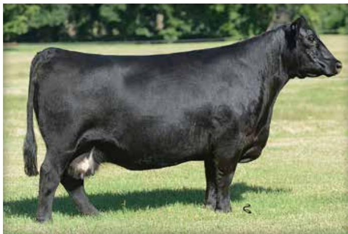
SILVEIRAS S SIS SANDY 2355 | Full Sister to Dam of Lots 18 & 19

SILVEIRAS STYLE 9303 SILVEIRAS S SIS SANDY 3344 K N C CABIN CREEK SANDY 804