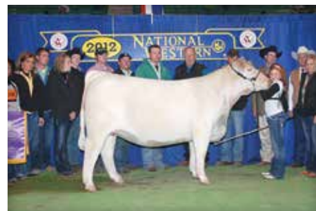
TR MS IVORY ANGEL 0711 | 2012 NWSS Grand Champion Charolais Heifer and Full Sister to Dam of Lots 15-17