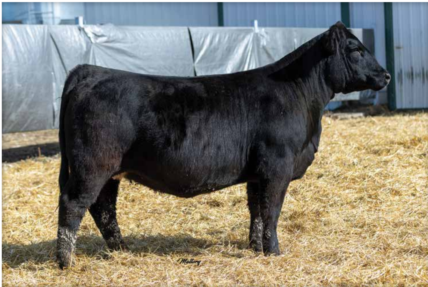
LOT 32 MOORE NIGHT WATCHS RHYTHM