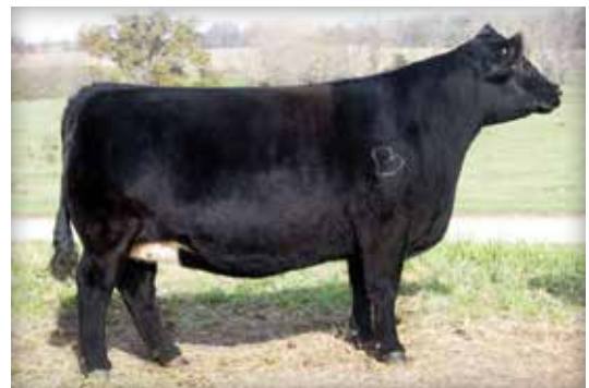
MISS STAR ABOVE | Maternal Granddam of Lot 11