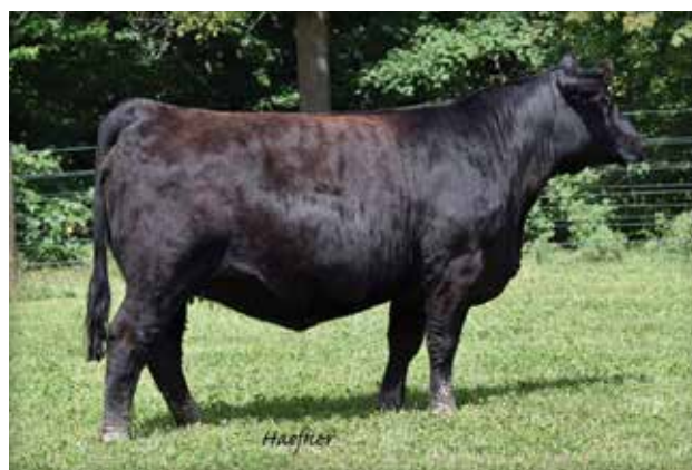
KNA BEYONCE F814 | Dam of Lot 38

PE 4/16/22-7/13/22 TO RUBYS NIGHT WATCH 986G (ASA 3594816) & RUBYS NIGHT WATCH 978G (ASA 3594822)