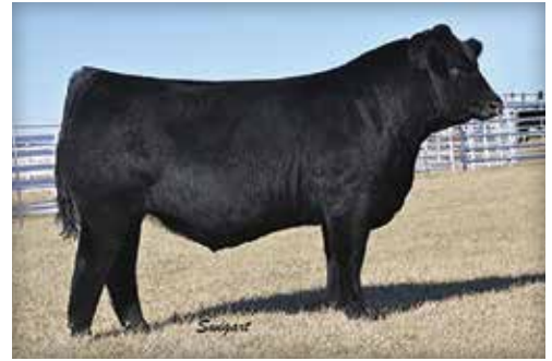
MOORE LOADED FOR DEMAND Maternal Brother to Lot 37