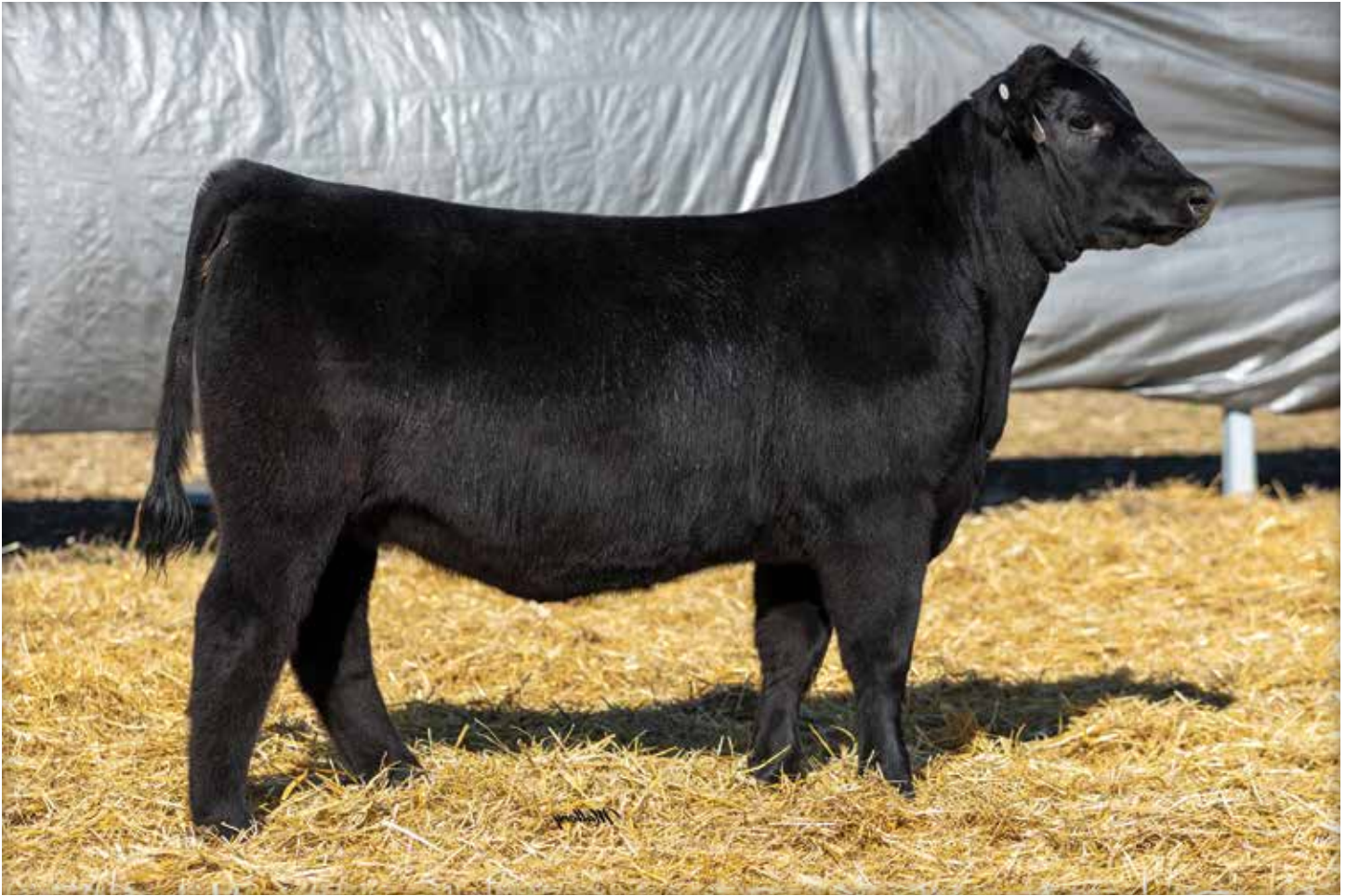
LOT 20 MOORE KENDALL 35K ET