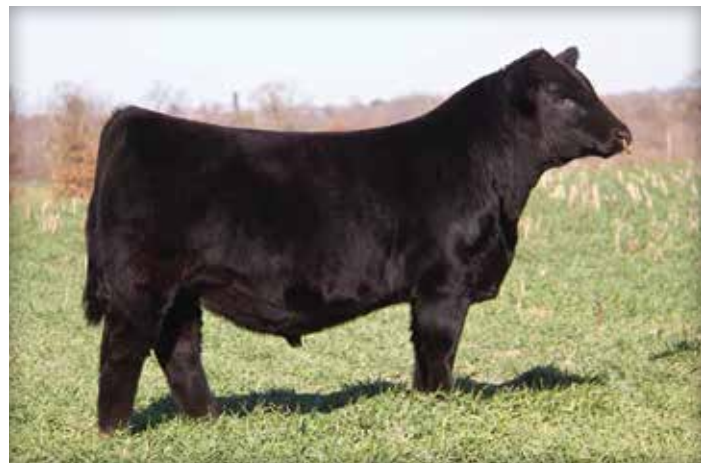
SCHOOLEY ELI 434B | Sire of Lots 44 - 46

PE 4/11/22-7/13/22 TO RUBYS NIGHT WATCH 986G (ASA 3594816) & RUBYS NIGHT WATCH 978G (ASA 3594822)