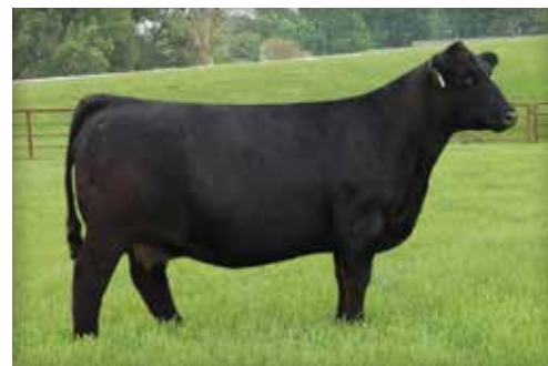
SULL STOCKMAN 8406 Legendary Maternal Granddam of Lot 39