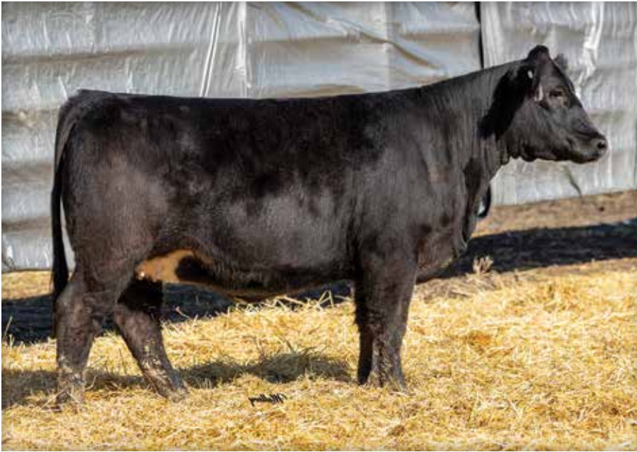
LOT 36 MOORE GOLDEN CANDY 2J