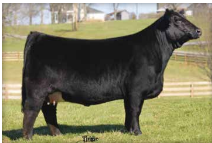
TNLG HOPES DESIRE A572 | Dam of Lot 3