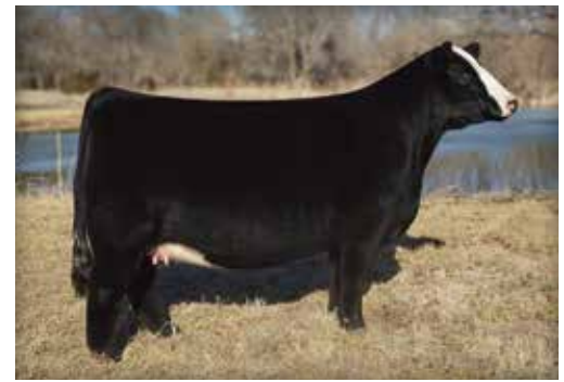
BPFC SHELBY 542Z | Full Sister to Dam of Lot 13