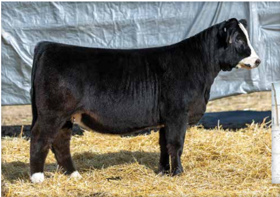
LOT 5 MOORE KAYLEE 92K