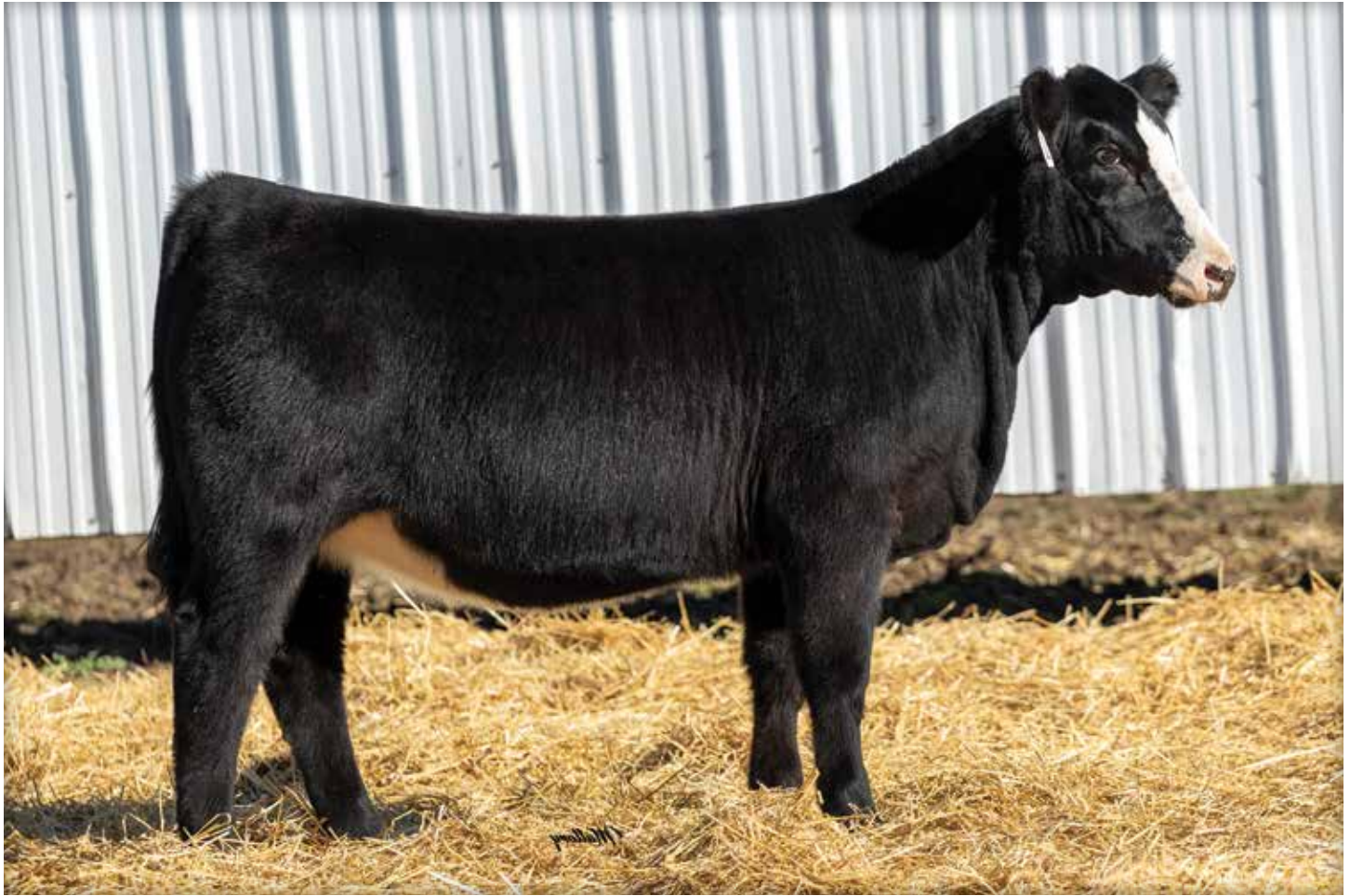
LOT 11 MOORE KATHY 101K