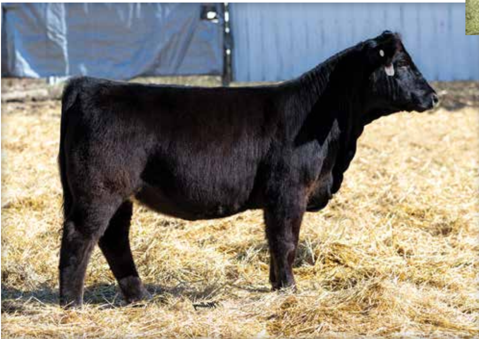
LOT 10 MOORE KATIE 79K