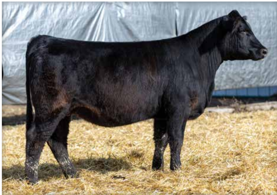
LOT 41 MOORE MS STONEHENGE 105J