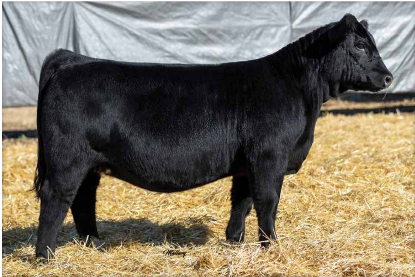
LOT 2 MOORE ALLISON 23K