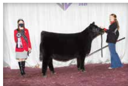
UDE KEYMURA KATY 0252 | 2021 Cattlemen's Congress Division Champion and Maternal Sister to Dam of Lot 24