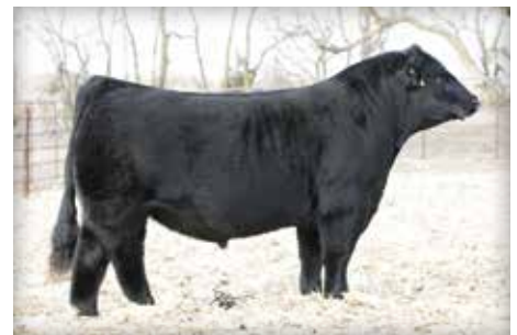
ACLL FORTUNE 393D | $185,000 Sire of Lots 7 & 8