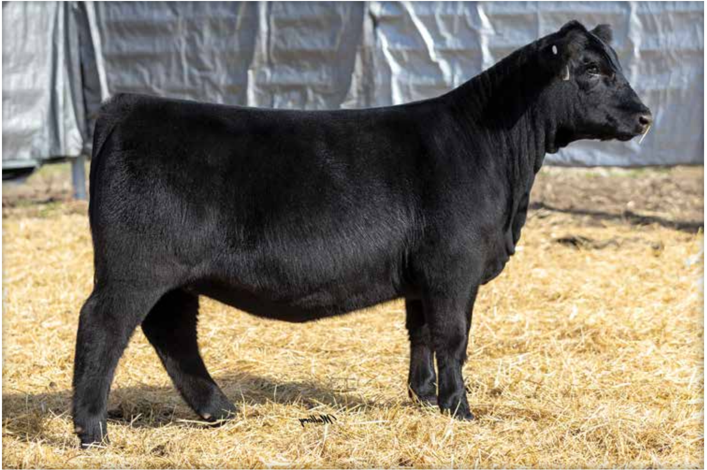
LOT 4 MOORE FORT KNOXS PLAYMATE 38K