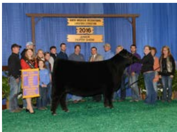
KDJ Queen Ruth 502, Dam of Lots 1-4

PVF Insight 0129 KDJ Queen Ruth 502 KDJ Queen Ruth