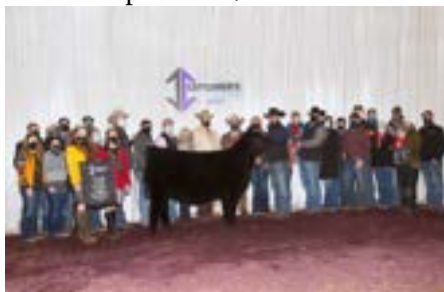
UDE Blackbird 0153 Maternal Sister to Lot 14

SHOW HEIFER raising donor dam with the extra “bells and whistles” that is necessary to raise elite cattle that command a premium. UDE Blackbird 1151 is by Conley Express 7211 and backed by the influence of the legendary Hoffman H/G Blackbird 620 donor dam, most commonly known as the 2017 NJAS Grand Champion Angus Heifer. “620” is also the dam of the $300,000 female selected by the Ferree family in 2020 that was selected as the 2021 Cattlemen’s Congress Reserve Grand Champion Angus Heifer, along with countless other Supreme Champion titles as the most competitive jackpots in the Nation. This past October four maternal sisters to 1151 sold for an average of $18,500 with a high of $55,000. If you’re serious about investing in a female that has the credentials to be a big league show heifer producer, then look no further!