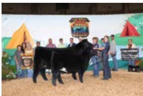
Miss Worthy 1H Maternal Sister to Lot 52