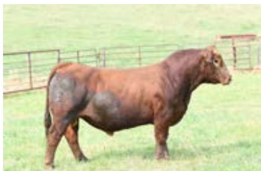
UDE Profit 67F "Code Red" Full Brother to Lot 32

Next up is a powerful daughter of Profit that is backed by TJSC Kansa 823B, making her a FULL SISTER to UDE Profit 67E, the senior herd sire at Udell Cattle Company that is most commonly known as "Code Red". He has been a tremendous breeding bull that has experienced tremendous success with very limited use. A pair of daughters by "Code Red" averaged more than $7,500 in the Black Label this fall, while another daughter was purchased by Fletcher Larsen in "The Advantage" in 2020 for $23,500. Another full sister to 165J, UDE Kansa 40F, commanded a $45,000 hammer price in "The Advantage" before being selected as the 2018 NAILE Division I Champion. A can't miss Purebred mating supports this female!