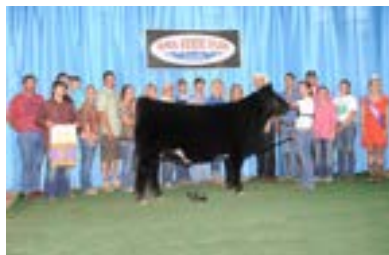
Dunk Hottie 413Y