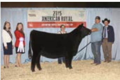
KAF Century Missie 164 Dam of Lot 17

UDE Missie 1045 is by EXAR Blue Chip 1877B and backed by the influential KAF Century Missie 164, the very popular daughter of Century Unbelievable 262 that was the 2015 American Royal Reserve Grand Champion Angus Heifer. A daughter by Colburn Primo 5153 was successfully campaigned by the Nikkel family to countless victories including being selected as the 2018 NAILE Reserve Grand Champion Angus Heifer of the Junior Show. A powerful female backed by tremendous maternal prowess.