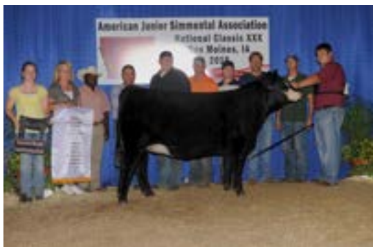
Farrah 15W Matriarch to Lots 35-38

When UDE Fantasia 118J came into the picture pen there was no denying the maternal prowess, added volume and capacity that this female possesses. She is a brood cow in the making! 118J is sired by the record selling SO Remedy 7F and backed by a genetic combination that has resulted in countless high sellers, champions, and individuals of influence. The maternal side of her lineage reads with the MR TR Hammer 308A x WS Pilgrim H182U x WAGR Driver 706T cross that seems to never miss. The fourth generation dam of 118J is Farrah 15W, Mitchell's 2010 AJSA National Classic Reserve Grand Champion Percentage Heifer.