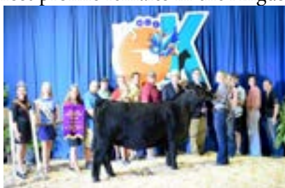
UDE Ellie 9230 Full Sister to Lot 7