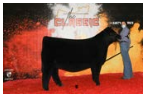
UDE Black Thunder 5H Maternal Sister to Lot 52