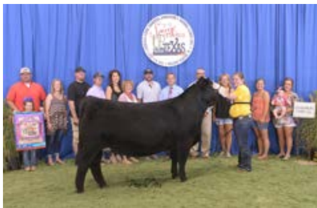
Harrell Barb Rose 313A Grandam of Lot 48

UDE Barb Rose 354J is the first of the UDE Profit 67F “Code Red” daughters in the offering. She is supported by the influence of Harrell Barb Rose 313A, the 2015 AJSA National Classic Grand Champion Purebred Simmental Heifer. A maternal sister to the dam of 354J by WS Pilgrim H182U, UDE Barb Rose 126G, was purchased as a bred heifer by the Richburg family of Texas for $8,750. She has matured into an absolute picture perfect female that is now a cornerstone in their breeding program. This fall a daughter of 126G sold for $25,000 in The Black Label. Here is a female that is backed by a cow family that consistently yields results!