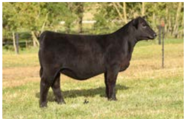
$100,000 High Selling Female in the Weis Cattle Company Online Sale Daughter of UDE Queen Ruth 9088

Make your own champions with a "502" daughter!