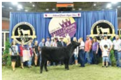
UDE Queen Ruth 109E Maternal Sister to Lots 1-4