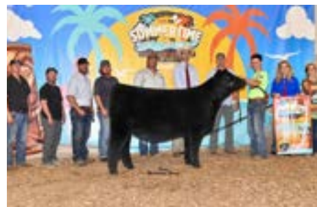
UDE Thunder Girl 157G Maternal Sister to Lot 52