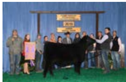
Kruse Missie Primo 147 Paternal Sister to Lot 47