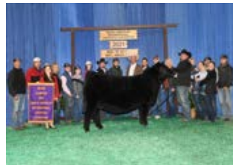
UDE Queen Ruth 0204, Full sister to Lot 1