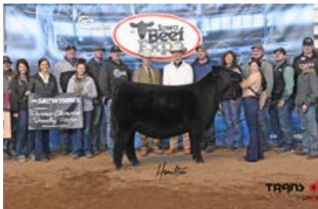
2022 IA Beef Expo Reserve Champion Junior Breeding Heifer Daughter of UDE Queen Ruth 9088