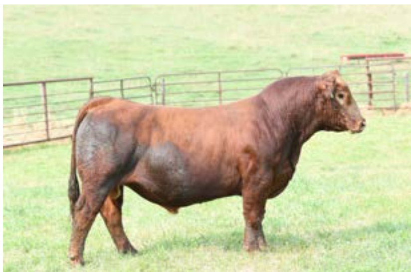
UDE Profit 67F "Code Red" Sire of Lots 37 & 38

UDE Fantasia 371J is by "Code Red" and backed by the influence of W/C Bankroll 811D and traces to the great Farrah 15W. She is an ultra-sleek designed, long fronted female that is big hipped and square pinned. She is confirmed safe in calf to the PVF Surveillance 4129 son that is out of KAF Century Missie 164, a many-time Champion that has produced countless high sellers and show ring champions.