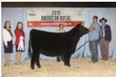
KAF Century Missie 164 Paternal Grandam of Lot 47