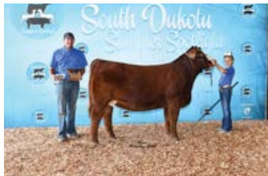
UDE Eunice 90E Descendant of Farrah 15W

AI BRED ON 4/8/22 TO GSC GCCO Dew North 102C. SAFE AI. ESTIMATED DUE 1/15/23.