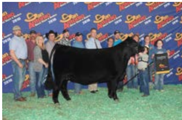
UDELL Farrah's Surprise 170B Maternal Sister to Dam of Lot 37

UDE Farrah 236J is another derivative of the great Farrah 15W, the 2010 AJSA National Classic Reserve Grand Champion Percentage Simmental Heifer. She is sired by "Code Red" therefore combining two of the most successful Simmental females ever campaigned here at Udell Cattle Company. 236J is a bigger framed, long bodied female that offers excellent shape extension.