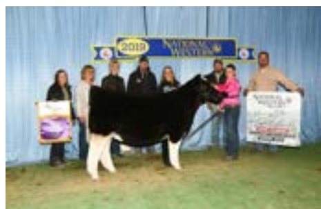
UDE Stylin' 28F Maternal Sister to Lot 52