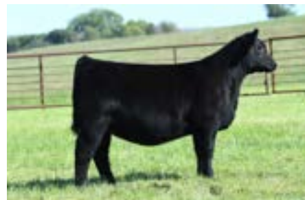
UDE Saras Dream 1086 Maternal Sister to Lot 15