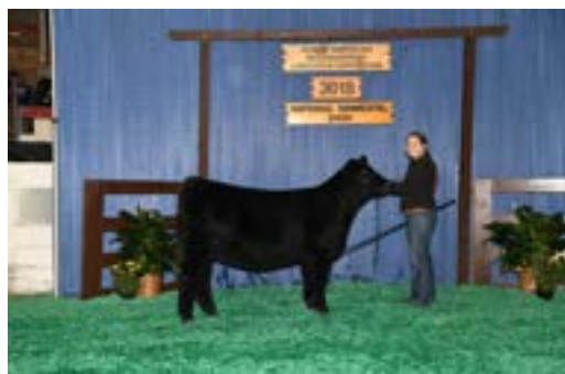
UDE Kansa 40F Full Sister to Lot 32