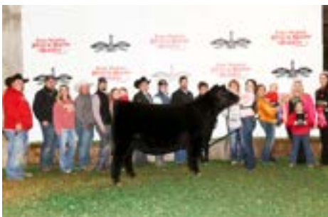
UDE Queen Ruth 1001 Full Sister to Lot 1

PVF Insight 0129 KDJ Queen Ruth 502 KDJ Queen Ruth