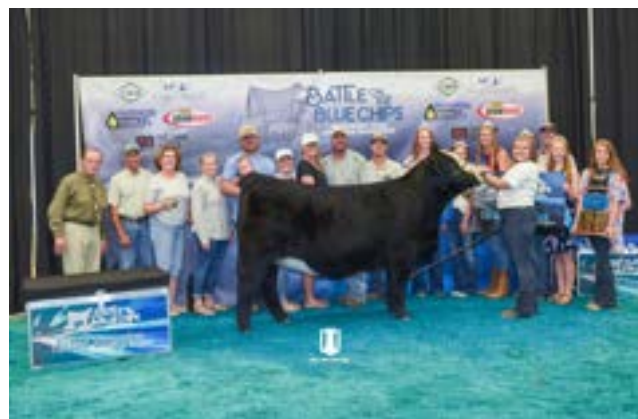
UDE Barb Rose 18F Full Sister to Dam of Lot 48