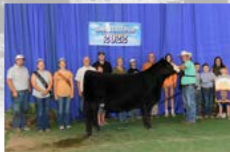
UDE Diamond 141J, Full Sister to Lots 20-23