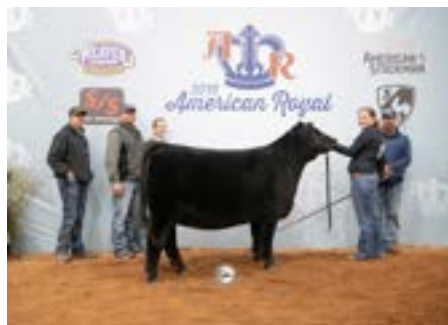
UDE Ellie 153E, Maternal Sister to Lots 5-8

AI BRED ON 4/9/22 TO BUSH'S WING MAN 201. SAFE AI. ESTIMATED DUE 1/16/23.