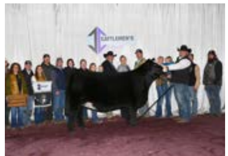
KDP Miss Hoya Hayleigh, Dam of Lot 29

AI BRED ON 4/7/22 TO SS/PRS HIGH VOLTAGE 224X. SAFE AI. ESTIMATED DUE 1/14/23.