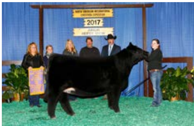
MMK Young Love 504D Grandam of Lot 46

AI BRED ON 4/6/22 TO GSC GCCO Dew North 102C. SAFE AI. ESTIMATED DUE 1/15/23.