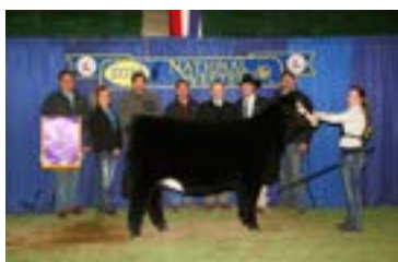
Haras Miss Princess 100Z Dam of Lot 43

It never ceases to amaze us what Hara's Miss Princess 100Z is capable of, regardless of the sire of choice and in this instance... breed of choice! 100Z has created quite a resume in terms of producing elite SimGenetic cattle that have experienced tremendous success across the nation and have proven to generate when in production, as proof of the number of 100Z derivatives that have reached Purebred status. We have had excellent success with SCC SCH 24 Karat 838 in our Angus and Chianina breeding programs, so why not try 100Z? His dam, FCF Proven Queen 419 has been attested as one of the greatest Angus females to ever grace the show ring. It's no secret that Hara's Miss Princess 100Z was a successful show heifer herself, being selected as the National Western Stock Show Grand Champion as a calf. A low percentage mating that combines the "who's who" of genetics of the business!