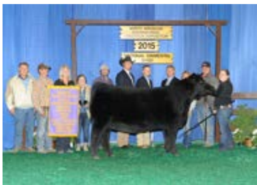
TJSC Kansa 823B Dam of Lots 30-32

UDE Kansa 186J is by the influential W/C Executive Order 8543B, one of the many breed impacting sons of the legendary Miss Werning KP 8543U. 186J is a big footed, stout boned, square constructed female that is flawless on the move. She is a maternal sister to the popular UDE Profit 67F “Code Red”, a sire that has done an excellent job in our program. TJSC Kansa 823B was Reserve Grand Champion at the AJSA National Classic, American Royal, NAILE, and Denver. A proven pedigree supports the phenotype and quality that this female brings to the table. She is safe to her AI date for a quick return on investment.