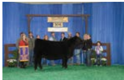
SULL Keymura's First 4086 Maternal Grandam of Lot 47