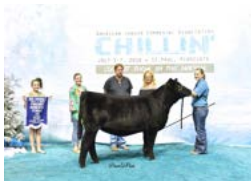
UDE Kansa 702E Maternal Sister to Lots 30-32

AI BRED ON 4/6/22 TO SS/PRS HIGH VOLTAGE 224X. SAFE AI. ESTIMATED DUE 1/13/23.