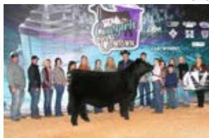
UDE Ellie 9197 Full Sister to Lot 7