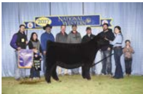
UDE Kate Spade 59D Maternal Sister to Lot 52