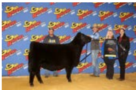
UDE Keymura Katy 1054 Full Sister to Lot 13

Bridle Reserve Supreme Champion Heifer in Ring B. The "Keymura Katy" cow family has influenced programs not only in the Angus business, but also across breed lines with tremendous results.