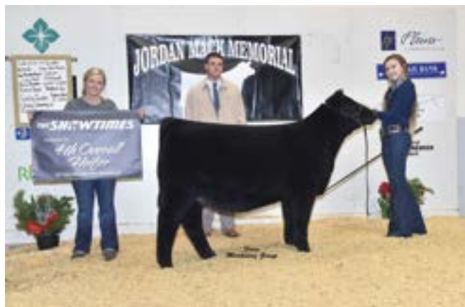
UDE Proven Queen 147E Maternal Sister to Lot 18

Dameron First Class Greimans Proven Queen 63 PVF ALL Proven Queen 757