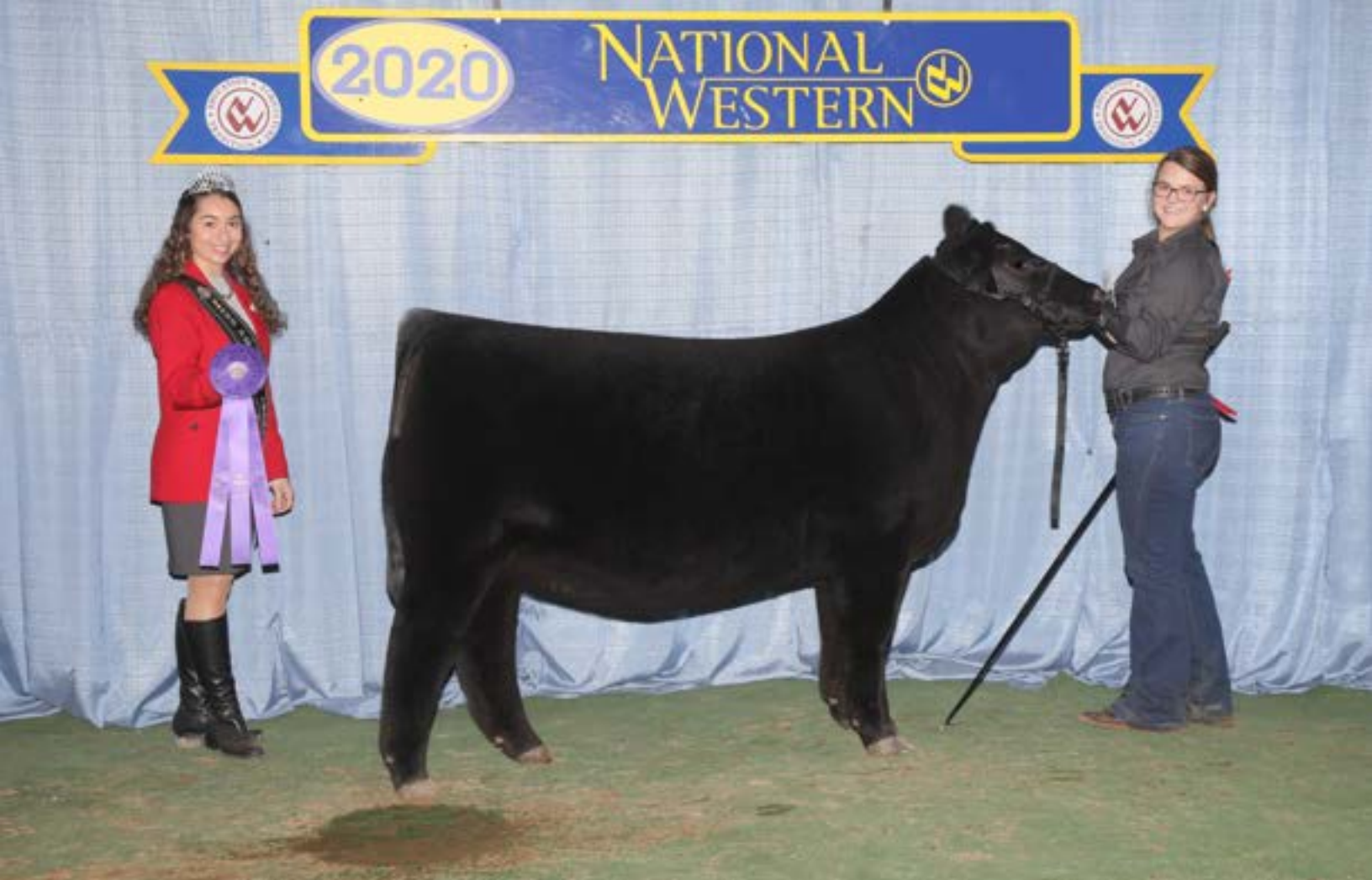
UDE Queen Ruth 9088, Full Sister to Lot 1