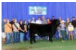
UDE Princess 5J

It never ceases to amaze us what Hara's Miss Princess 100Z is capable of, regardless of the sire of choice and in this instance... breed of choice! 100Z has created quite a resume in terms of producing elite SimGenetic cattle that have experienced tremendous success across the nation and have proven to generate when in production, as proof of the number of 100Z derivatives that have reached Purebred status. We have had excellent success with SCC SCH 24 Karat 838 in our Angus and Chianina breeding programs, so why not try 100Z? His dam, FCF Proven Queen 419 has been attested as one of the greatest Angus females to ever grace the show ring. It's no secret that Hara's Miss Princess 100Z was a successful show heifer herself, being selected as the National Western Stock Show Grand Champion as a calf. A low percentage mating that combines the "who's who" of genetics of the business!