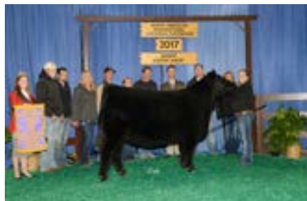
Hoffman H/G Blackbird 620 Dam of Lot 14