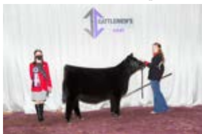
UDE Keymura Katy 0252