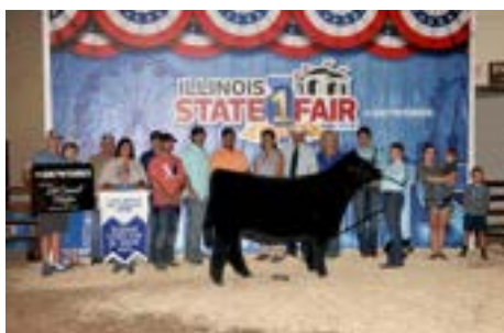
UDE Stylin' Thunder 22J Maternal Sister to Lot 52