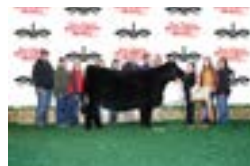
UDE Norma Jean 114D