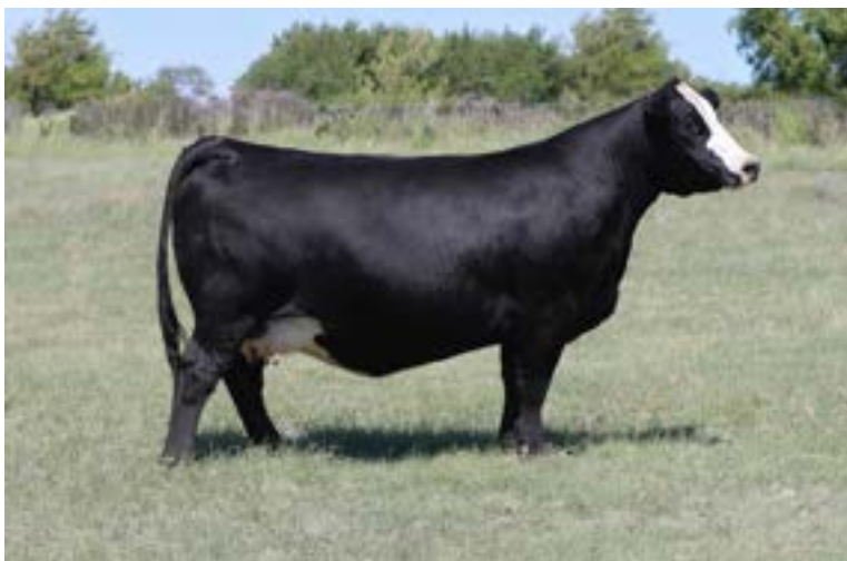
UDE Barb Rose 126G Maternal Sister to Dam of Lot 48