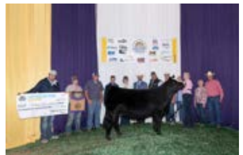
UDE Kansa 37J, 3/4 Sister in blood to Lot 33

AI BRED ON 4/6/22 TO THSF LOVER BOY B33. SAFE AI. ESTIMATED DUE 1/13/23.