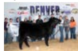
UDE Princess 159G