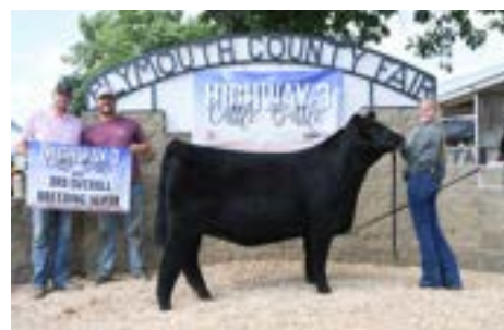
UDE Thunder Girl 93J Full Sister to Lot 52