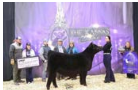
UDE Keymura Katy 1216 Maternal Sister to Lots 9-13