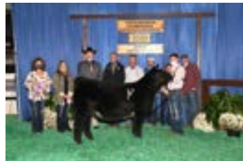
JSUL/TSSC Beth Dutton 0113H ET