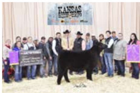
KAF Missie Primo 147 Maternal Sister to Lot 17