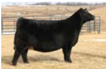
UDE Glamour Girl 18B

In production these "Red Thunder" daughters get the job done... plain and simple. UDE Glamour Girl 18B has been a big time generator for Sullivan Farms. The dams of UDE Thunder 324J and UDE Thunder 109J are full sisters to UDE Glamour Girl 18B, along with the long list of other females from this mating that have continued to dominate the field for well over a decade! 324J is by "Code Red", while 109J is sired by JSUL Something About Mary 8421, making both females dual registered as Foundation Simmental/Low Chianina. The influence that "Red Thunder" has had for the last decade is nothing short of incredible... tie to a cow family that offers true generating power!