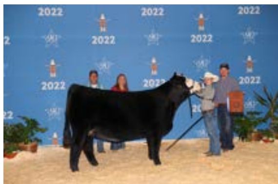
UDE Miss 348H Maternal Sister to Dam of Lot 44