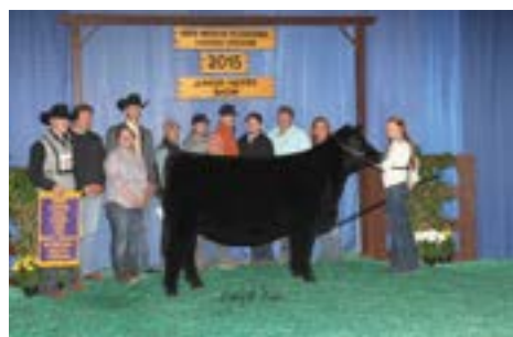
UDE She's Stylin' 424B Maternal Sister to Lot 52

For over a decade JSUL Red Thunder 9051W has maintained her status in the business as one of the all-time high income producing females in the Chianina breed. She has well over a Million Dollars in progeny sales and a resume of champions that is unparalleled. Her reign continues year after year as she generates high sellers and champions! In the 2021 Edition of "The Advantage" the Gensini family of Illinois selected UDE Stylin' Thunder 22J for $80,000. She was selected as the 2022 NWSS 3rd Overall Prospect Heifer and most recently was the IL State Fair Grand Champion Chianina Heifer and 5th Overall Junior Breeding Heifer. The Goettemoeller family has campaigned Miss Worthy 1H ET to the title of 2021 and 2022 National Junior Heifer Show Grand Champion Owned Heifer among countless other major stock show victories during her career. The Hanes family of Ohio purchased the Conley No Limit sired female in "The Advantage" 2022 edition for $30,000. UDE Thunder 50J is a direct daughter of the legendary donor dam JSUL Red Thunder 9051W that is sired by S A V Bismarck 5682. This High Chi female has the credentials to be a big time donor for any program!