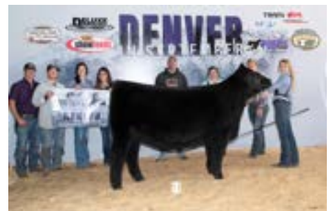
UDE Queen Ruth 9064 Maternal Sister to Lots 1-4