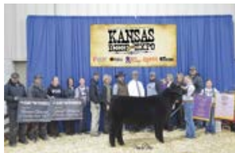
UDE Chanel 39D Maternal Sister to Lot 52