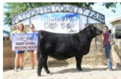
UDE Keymura Katy 1257