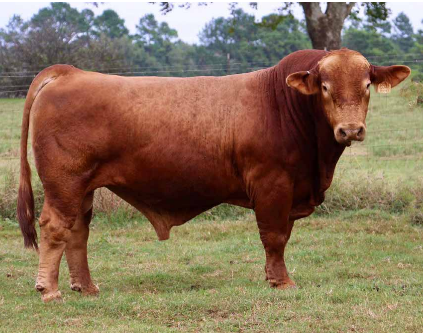
LMC SSC ANGELO 852F OFFERED BY SEALE SHOW CATTLE & LA MUNECA CATTLE COMPANY