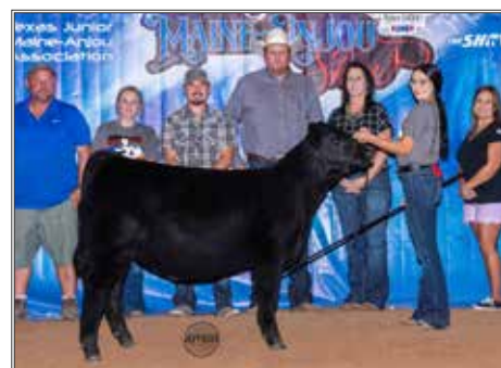
RIM KISS AND TELL 26K ET 2022 TJMAA GRAND CHAMPION B & O MAINE-ANJOU HEIFER