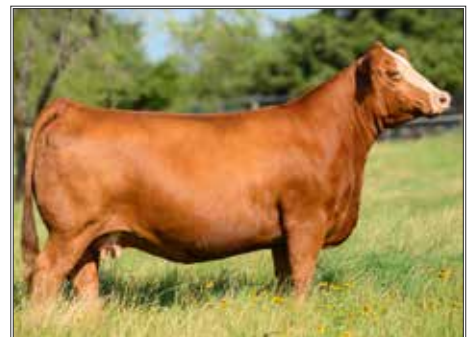
KCC1 TIARA 131Z MATERNAL GRANDDAM OF LOTS 1A & 1B

We felt it only suiting to initiate this year's offering with a very high quality, high caliber set of red heads. These two represent a past high selling bred female that works very hard in the Bird donor pen. She consistently brings the goods year after year with a lifetime female progeny average well over $20,000. HOC Dream Tiara 131D stamps each and every one of her daughters with plenty of shape and body, with the desired build and presence that is certainly in demand. The matriarch that supports this duo is the famed "Tiara" cow family that was a foundational building block in the early years of the Kearns Cattle Company program. Her progeny were saturated with western rancher power and muscle shape. Full brothers to the maternal granddam of these redheads were Champion Pen of Three at the 2013 National Western Stock Show. KCC1 Tiara 130Z, another sister, highlighted Circle M Volume One and now works for Red River Farms.