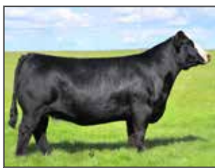
KCC1 HAVANA 83E DAM OF LOT 6