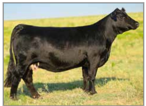
LKCC MISS GENESIS 72G DAM OF LOT 22