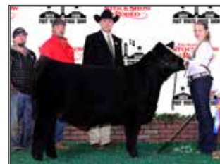
BAR -O- BRETТА 2015 FWSS GRAND CHAMPION PB SIMMENTAL & MATERNAL SISTER TO LOT 3