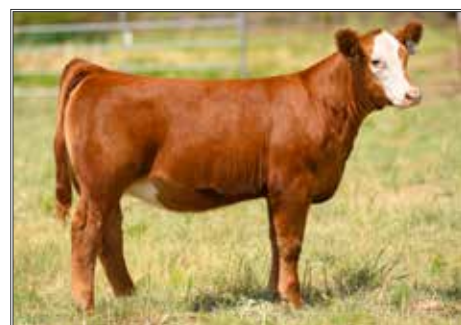
JCB MISSY 118J $11,500 MATERNAL SISTER TO DAM OF LOTS 50, 51A, & 51B

PE FROM 5/21/22-7/5/22 TO JSSC CADILLAC KIND 86G (ASA 3886604)