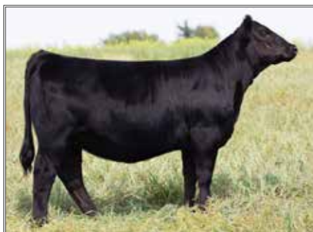
BAR O HARLEE 061H DAM OF LOT 15