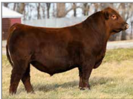
SIX MILE WOOD RIVER 219H SIRE OF LOT 40