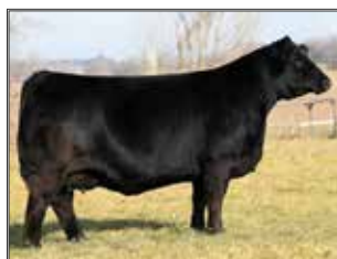
W/C ANGEL 2870Z FULL SISTER TO MATERNAL GRANDDAM OF LOT 13