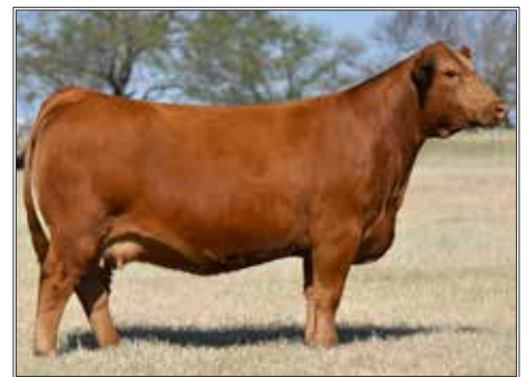
BLC1 EVELYN 476E DAM OF LOTS 2A & 2B