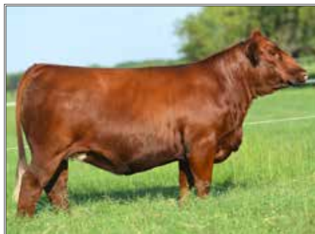
HOC DREAM TIARA 131D $32,000 DAM OF LOTS 1A & 1B