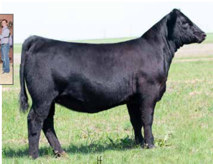
NFFS KENNEDY 2204K OFFERED BY NIXON FAMILY FARMS