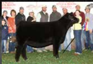
2022 FWSS CHAMPION JUNIOR SIMMENTAL HEIFER