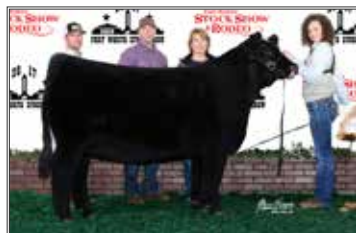
HOF EBONY'S JOY 5392C DAM OF LOT 25 2017 FWSS DIVISION CHAMPION