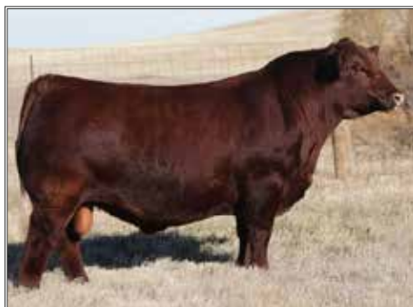
WEBER REFORM 618 SIRE OF LOT 39