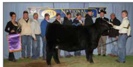
KLS DIAMOND W516 2011 NWSS GRAND CHAMPION PUREBRED SIMMENTAL HEIFER INFLUENTIAL MATERNAL GRANDDAM OF LOT 20