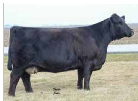
WLE MISSY U409 MATERNAL GRANDDAM OF LOTS 50, 51A, & 51B

We initiate the bred female division with a tremendous Purebred female that is from the heart of the Seale Show Cattle program. The dam of JSSC Missy 106J was bred in the Horstman Cattle Company program of Indiana and is sired by FBFS Wheel Man 649W, the 2011 NWSS Grand Champion Purebred Simmental Bull. The prolific maternal granddam of this powerful female is the legendary WLE Missy U409, a foundation breeding piece in the Bird Cattle Company program of Lubbock. In fact, several daughters of the late WLE Missy U409 have been past high sellers and featured lots in The Black Label. 106J is sired by the $120,000 KCC1 Exclusive 116E, a notable sire that will consistently inject body, dimension, and genuine shape to his progeny. The cow family that supports his lineage is also responsible for the $230,000 KCC1 Countertime 872H, the $60,000 KCC1 SWC Harmony 847H, and the $30,000 KCC1 Estelle 510E. This bred heifer boasts an absolutely royal pedigree that will make a profitable addition to any operation! PE FROM 5/21/22-7/5/22 TO JSSC CADILLAC KIND 86G (ASA 3886604)