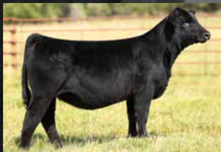
LOT 10A - KCC1 SWC HARMONY 847H