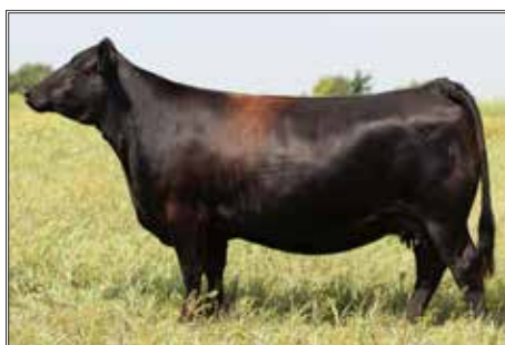
CRSS LADY DONE IT DAM OF LOTS 16 & 17A & 17B