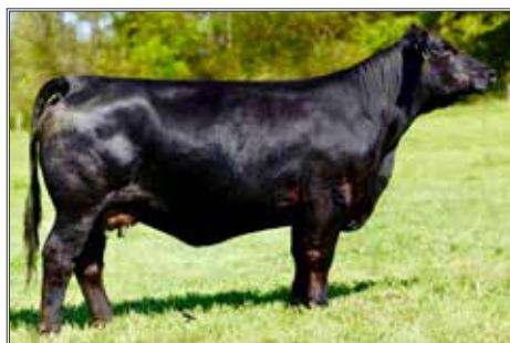
LMC DAYDREAM 5Z/173 INFLUENTIAL DAM OF LMC SSC ANGELO 852F