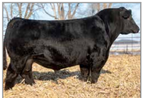
W/C DOUBLE DOWN 5014E $105,000 SIRE OF LOT 15

This particular creature brings a multitude of production tied to this very sale when it was a fall and spring event. 261K is a granddaughter of the past Kansas City Champion known as CRSS Lady Done It. Her dam is a direct daughter of MR HOC Broker, and that stamp of phenotypic excellence was placed here. This heifer was another raised by a two-year-old through the adverse weather pattern we experienced this summer. Her hair has been a challenge, but it will come, and it will be good when it gets there. Folks this thing is built very good, wild necked, good in her chest, very good on the ground, good in her rib and back shape, and way sound. She is the TRUE SLEEPER of the fall, no questions asked. Period.