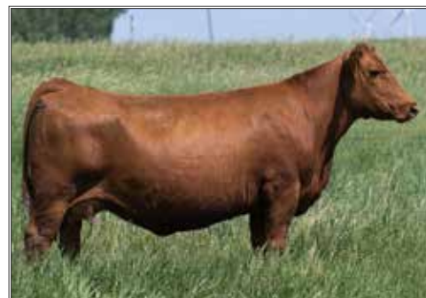
VF GWEN 1669-325 DAM OF LOT 39

On the pursuit to provide the highest caliber seedstock in every division of the Black Label we are grateful for the opportunity to work with Jesse, Michelle and their family at Weber Land & Cattle of Lake Benton, Minnesota. They own and operate one of the most impressive cowherds you will find, regardless of breed or color and the four Red Angus heifers they bring to town are hand sourced from the cream of the crop. WEBR Gwen 291 is impeccable in her build and type, long and elegant in her silhouette, tying high out of the apex of her blade, true and square on all four corners, and gaits with the same genuine squareness and elegance. But we realize that it takes more than just a pretty face to be a dominate for in the ring these days, and that is what makes Gwen 291 so unique, she will awe you with her stoutness of structure, circumference of foot size and density of bone. We think this one competes at the highest level, her structure alone elevates this one into a crowd with seldom members.