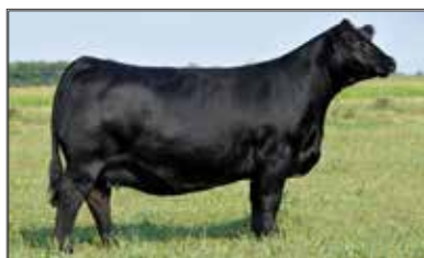
MARI 758E DAM OF LOT 14 2018-2019 TRIPLE CROWN WINNING SIMMENTAL HEIFER