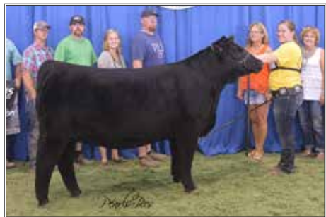
TJSC KANSA 823B MATERNAL GRANDDAM OF LOT 30 2015 AJSA NATIONAL CLASSIC RESERVE GRAND CHAMPION PUREBRED SIMMENTAL HEIFER