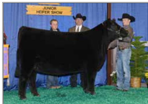
PLUM CREEK MISS ANNIE LU 361C MATERNAL GRANDDAM OF LOT 37