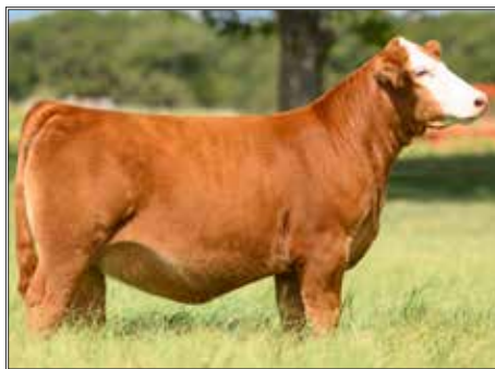
SWC GRACE N MELODY 329G $13,500 MATERNAL SISTER TO LOTS 2A & 2B