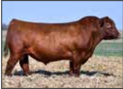
LSR SRR TAKEOVER 5051C "BEARTOOTH" SIRE OF LOT 41