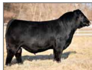
JBSF BERWICK 41F $109,000 SIRE OF LOTS 12A-14

This gem is saturated with the pedigree and the goods! The whale bellied goddess is from a direct daughter of JSSC Wide Body 090W that traces to a full sister the Werning lead off donor known as W/C Angel 2870Z, the 2014 National Champion Simmental Female that has emerged as one of the great producing daughters of the iconic W/C Miss Werning KP 8543U. This big pawed creature is stellar in motion, level in her design, and certainly robust in her center body. Her dam has done the job at Sheffield Ranch and -SR- Pistol Annie will do the same and more for her new owner!