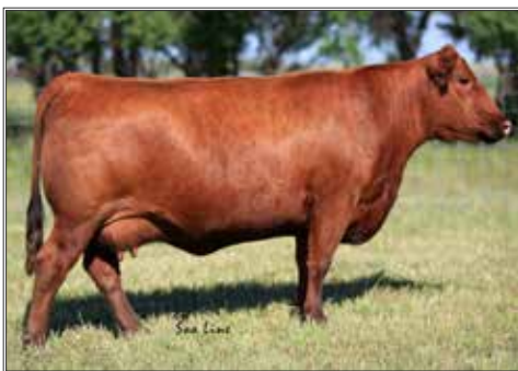
RED SOO LINE BANE BERRY 5238 MATERNAL GRANDDAM OF LOT 40