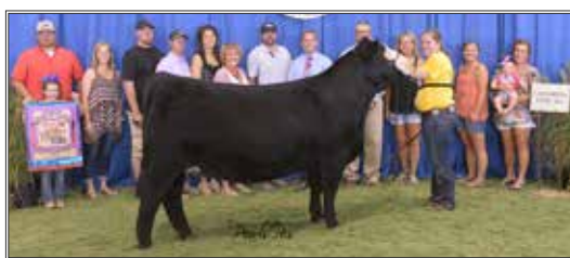
HARRELL BARB ROSE 313A GRANDDAM OF LOT 23 2015 AJSA NATIONAL CLASSIC GRAND CHAMPION % SIMMENTAL HEIFER