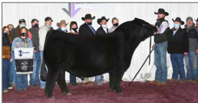
SO REMEDY 7F $530,000 RECORD SELLING SIMMENTAL AI SIRE 2021 CATTLEMEN'S CONGRESS GRAND CHAMPION SIMMENTAL BULL