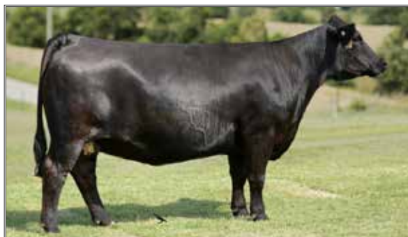
KCC1 TIARA 130Z MATERNAL GRANDDAM DAM OF LOT 19