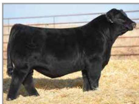
KCC1 EXCLUSIVE 116E $120,000 SIRE OF LOT 50