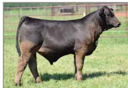
JSSC DOUBT ME NOW 084H OWNED BY BLOUNT FARMS, COX RANCH & LA MUNECA SON OF LMC SSC ANGELO 852F