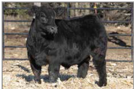
TL TITAN 43 SIRE OF LOTS 30 & 31