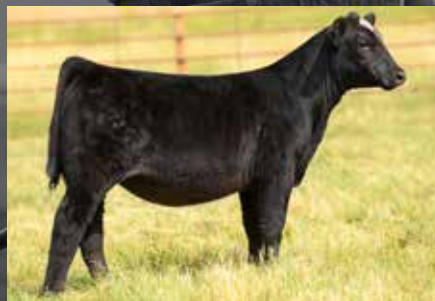
LOT 11 - KCC1 SWC HEAVENLY 26H