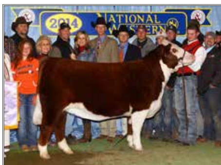
CHEZ STRAWBERRY WINE 204Z ET 2014 NWSS RESERVE GRAND CHAMPION P. HEREFORD HEIFER FAMOUS MEMBER OF THE "SWEET RED WINE" COW FAMILY