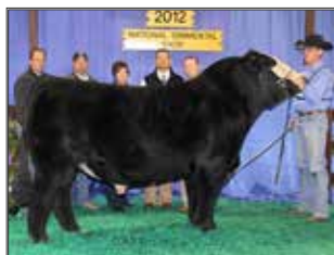
MR HOC BROKER SIRE OF LOTS 4 & 5

OFFERED BY SHIPWRECK CATTLE CO & A&D SULAK FARMS