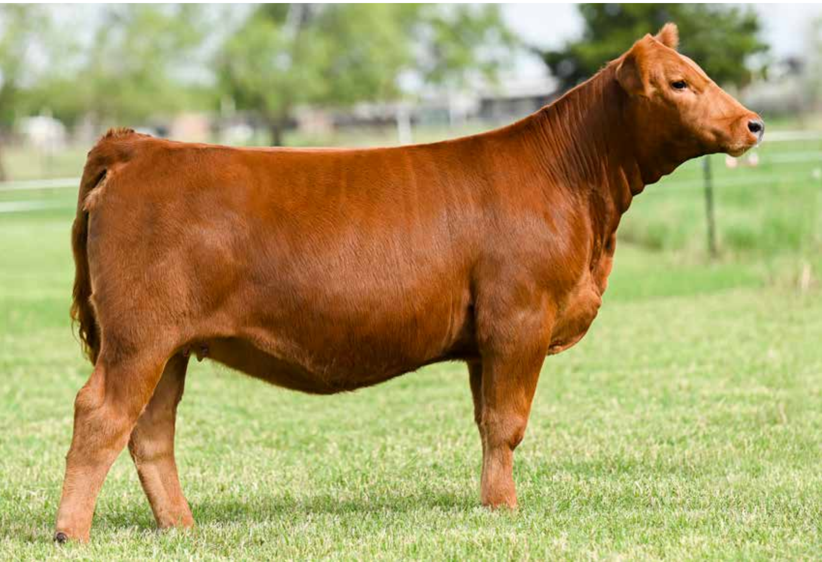
SWC KAREN 116K OFFERED BY SHIPWRECK CATTLE CO