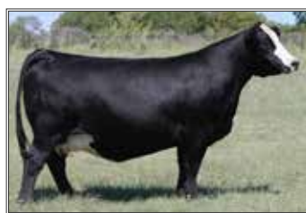
UDE BARB ROSE 126G DAM OF LOT 23