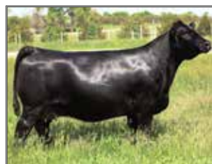
W/C MISS WERNING KP 8543U ICONIC 3RD GENERATION DAM OF LOT 13