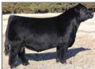
JSUL SOMETHING ABOUT MARY 8412 SIRE OF LOT 25