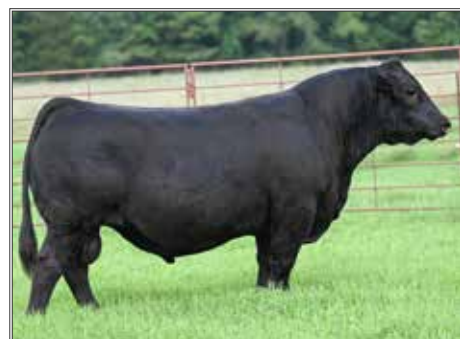
JSSC CADILLAC KIND 86G SERVICE SIRE TO LOTS 50-54

JSSC Miss 139J is a feminine, sleek designed female that is sired by JSSC Anchor 774E, a top son of CCR Anchor 9071B that is backed by JSSC Yovella 032Y, the impressive daughter of the foundation matriarch at Seale Show Cattle known as Angels Glamour T20. JSSC Yovella 032Y was the 2013 San Antonio Livestock Exposition Grand Champion Simmental Heifer for Laramie Huie. The maternal side of her lineage merges the influence of Sandeen Upper Class 2386, FBFS Slow Melt 089S, and the JS Sure Bet 4T son known as JSSC Yes Man 002Y. Another Purebred confirmed safe in calf to "Cadillac Kind"! PE FROM 5/21/22-7/5/22 TO JSSC CADILLAC KIND 86G (ASA 3886604)