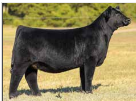
4/B MISS HONEY BUTTER 08J $280,000 RECORD SELLING SIMMENTAL HEIFER MATERNAL SISTER TO LOTS 18A & 18B