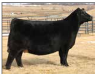
UDE GLAMOUR GIRL 18B DAM OF LOT 28

OFFERED BY SHIPWRECK CATTLE CO & SULLIVAN FARMS