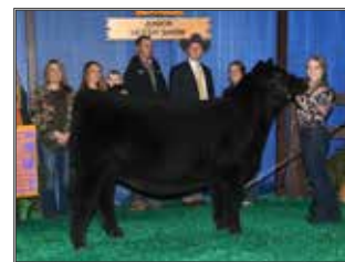
JSUL GLAMOUR PROFIT 8408F 2019 NAILE RES GRAND CHAMPION % SIMMENTAL HEIFER MATERNAL SISTER TO LOT 28