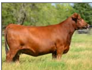
WR MS ROBIN 11B DAM OF LOTS 33A & 33B

When this mating was made, we could sense the "red hided craze" on the horizon! One would expect that a hetero black bull on a Red Angus cow would yield at least 50% red calves, however, as one can see that was not the case at all. Zero red calves conceived anyway, and we felt like these were the very best two to put in front of the buying crowd for the 2022 Black Label. The JSSC Wide Body 090W sire group influences the Black Label offering each year in some shape or fashion as indicated in the information throughout this book. WR Ms Robin 11B is the featured Red Angus donor dam of this sale series as well. She is a maternal sister to the great PZC TMS Firestorm 1800 ET, as well as countless other individuals of influence within the Red Angus breed. A maternal sister to WR Ms Robin 11B was selected as the 2016 AJSA National Classic Grand Champion Percentage Simmental Heifer for the Nickel family of Kansas.