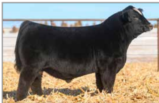
KCC1 COUNTERTIME 872H $230,000 SIRE OF LOTS 9 & 10