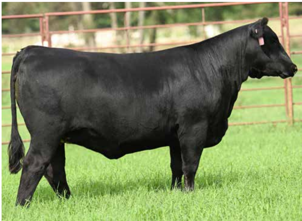
JSSC MISSY 103J OFFERED BY SEALE SHOW CATTLE

The next pair of ET flushmate sisters are supported by the same cow line as the impressive 106J female that leads off the bred division. Another duo that is supported by the everlasting influence of the iconic full sister to WLE Uno Mas X549! They are sired by the impressive EXAR Blue Chip 1877B son that is owned by Conley Cattle, 5T Power Chip 4790. These sisters are sensible in their frame size, bold about their forerib and center body, easy fleshing, and offer the look of future herd matrons that should prove to be profitable investments. This offering of bred heifers sell safe in calf to the service of JSSC Cadillac Kind 86G, a Purebred son of EZS Justify 002E that combines the LSB Josie 701Y and BT Susanna 55F cow families. Time tested, proven, highly maternal genetics that will never go out of style!