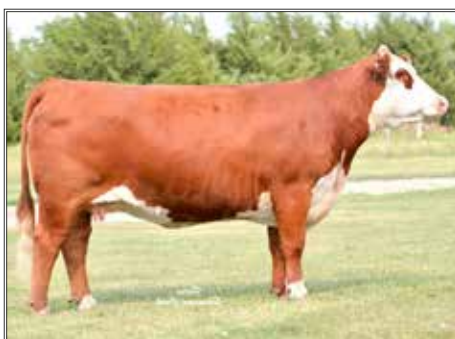
R SWEET RED WINE 039 INFLUENTIAL HEREFORD MATRIARCH