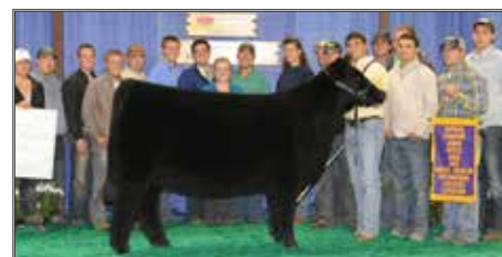
JSUL WHO DAT 1602 DAM OF LOT 29 2012 NAILE SUPREME CHAMPION JUNIOR BREEDING HEIFER