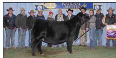
JPV MISS ROSE 34F FULL SISTER TO LOT 21 2020 NWSS GRAND CHAMPION PUREBRED SIMMENTAL HEIFER

Another stunning February prospect that is the result of a successful embryo transaction made by Golden Acres