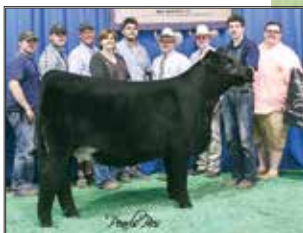
PZC CITA'S BROKER 5755C 2016 AJSA NATIONAL CLASSIC GRAND CHAMPION PERCENTAGE SIMMENTAL HEIFER MATERNAL SISTER TO DAM OF LOTS 33A & 33B