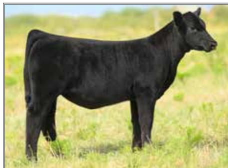
JARR JOLENE 102J OWNED BY JASE MOSELEY MATERNAL SISTER TO LOT 27