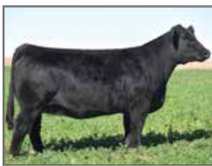
TKCC VICTORIA 57A MATERNAL GRANDDAM OF LOTS 6 - 8