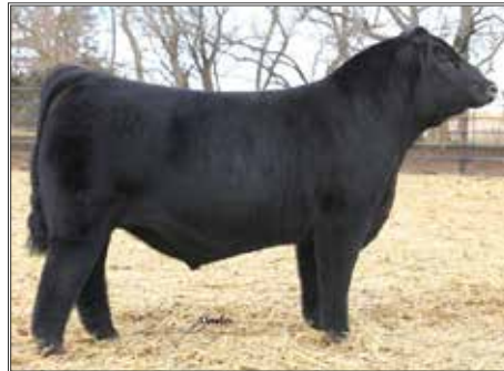
OMF HARD RIGHT H21 $60,000 SIRE OF LOT 8