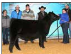
KCC1 SWC HARMONY 847H $60,000 DAM OF LOT 5 & FULL SISTER TO LOT 6 2021 COWGIRLS IN COWTOWN GRAND CHAMPION SIMMENTAL HEIFER