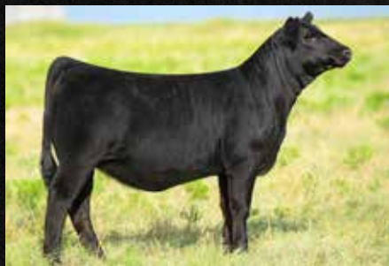
LOT 22A - MTZ LADY JEWEL J2101