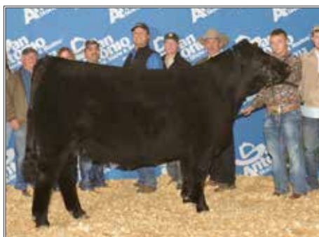
JSSC YOVELLA 032Y PATERNAL GRANDDAM OF LOT 52 2013 SAN ANTONIO GRAND CHAMPION PB SIMMENTAL HEIFER