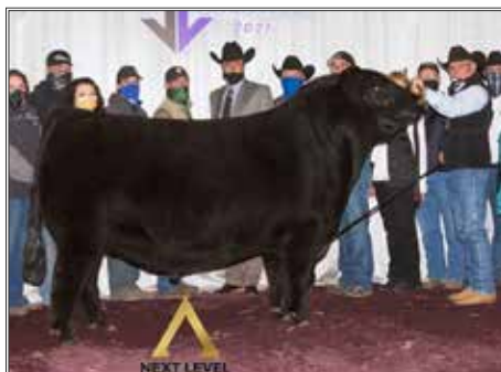
SILVEIRAS FORBES 8088 SIRE OF LOT 37 2020-2021 ROV SHOW BULL OF THE YEAR