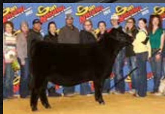
2022 SALE CHAMPION JUNIOR SIMMENTAL HEIFER