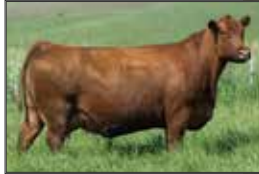
RED JENSEN SYBIL 337A MATERNAL GRANDDAM OF LOT 41

We hope you find the build of Sybil 227 as intriguing as we do, her overwhelming rib cage development and then the way she ties into a slender and eye appealing front third builds the foundation for a strong case of elite show heifer prospect in our mind. Combine her ideal proportions with the effortless approach that this "Beartooth" daughter has in regard to movement, and we think the sky is the limit. On our early pasture tours this summer, 227 was one that we kept gravitating too, it's not often that you find Red Angus cattle with the balance and composition that you find here. Delving into the pedigree of Sybil 227 reveals a maternal lineage that's generations deep of upper echelon producers and her grandmother, Red Jensen Sybil 337A is without a doubt one of the most powerfully built bovines you will set your eyes on, regardless of breed composition.