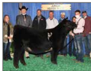
JSUL/TSSC BETH DUTTON 0113H 2020 NAILE RES GRAND CHAMPION AOB HEIFER FULL SISTER TO LOT 28