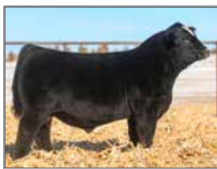
KCC1 COUNTERTIME 872H $230,000 PROMOTIONAL AI SIRE