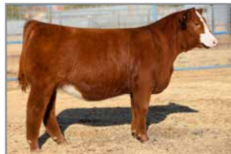
JCB MISSY E3856 $26,500 MATERNAL SISTER TO DAM OF LOTS 50, 51A, & 51B