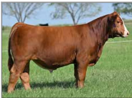
SWC RED WAVE 376J $85,000 MATERNAL BROTHER IN BLOOD TO LOTS 2A & 2B