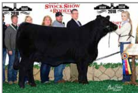
LMC SSC YOLANDA 5D/83 2018 FWSS NATIONAL CHAMPION SIMBRAH HEIFER FULL SISTER TO LMC SSC ANGELO 852F