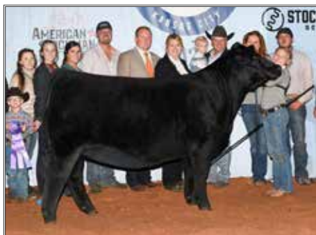
4/B MISS HONEY BUNS 50H 2021 AMERICAN ROYAL GRAND CHAMPION PUREBRED SIMMENTAL HEIFER MATERNAL SISTER TO LOTS 18A & 18B