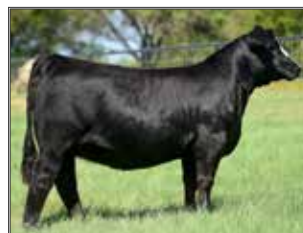
BAR -O- BONITA MATERNAL SISTER TO LOT 3