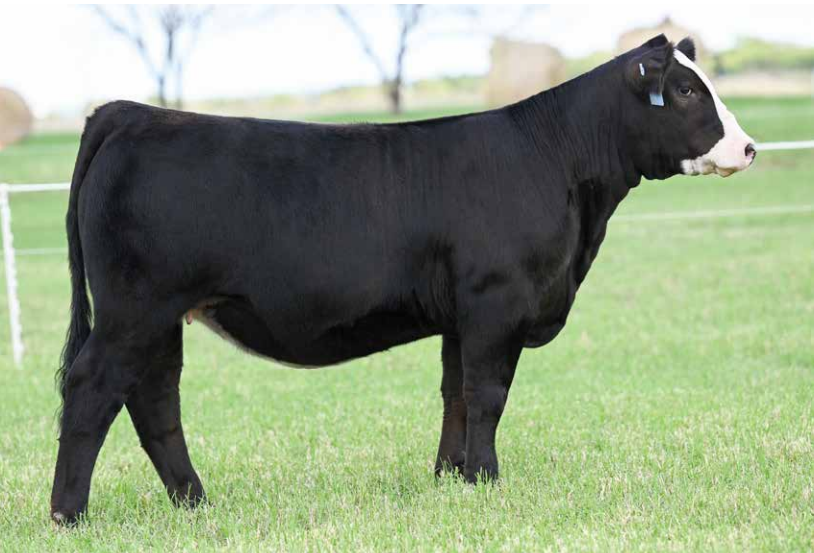
SFR SWC OOMA 303K OFFERED BY SHIPWRECK CATTLE CO & SMITH FARMS