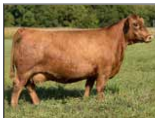
FBFS YASMIN 063Y DAM OF LOT 3