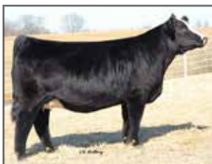
SC ROBINS KISS D27 MATERNAL GRANDDAM OF LOT 4