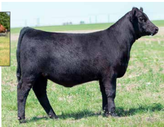
SWC NFFS KADENCE 2021K OFFERED BY SHIPWRECK CATTLE CO & NIXON FAMILY FARMS

We do like the soft centered, balanced look, and structural correctness that is found in this pair of sisters. Yes, they may be coming to town a bit greener than some of the others, but it has been proven time after time that progeny from both JSSC Wide Body 090W and WR Ms Robin 11B are very similar to good wine, they do get better with maturity, and some can be the best of their contemporaries at that point as well! Keep the faith, proven cow families on both sides always leads you to the desired destination.