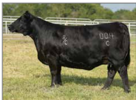
JSSC CAROLINA 004C 2017 FWSS GRAND CHAMPION SIMMENTAL HEIFER & DAM OF LOT 10

OFFERED BY SHIPWRECK CATTLE CO & SHEFFIELD RANCH