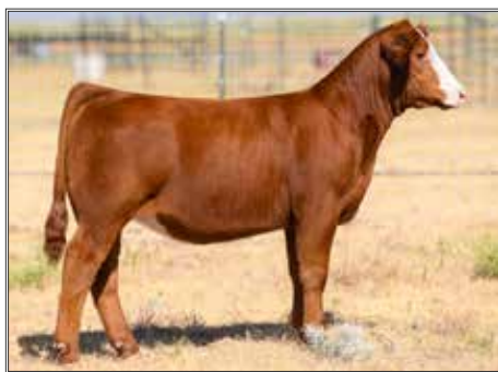
JCBB DREAM TIARA H018 $22,000 FULL SISTER TO LOTS 1A & 1B

LOT 1B PB SM TATTOO: K001 | DOB: 2/18/22 | ASA: 4088892 REMINGTONSECRETWEAPON185 DMCC COUNTER ATTACK 8C CARD FOREVER 61A JSSC WIDE BODY 090W HOC DREAM TIARA 131D KCCI TIARA 131Z