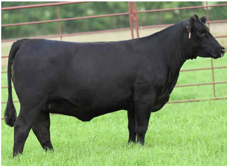
JSSC MISSY 104J OFFERED BY SEALE SHOW CATTLE

The next pair of ET flushmate sisters are supported by the same cow line as the impressive 106J female that leads off the bred division. Another duo that is supported by the everlasting influence of the iconic full sister to WLE Uno Mas X549! They are sired by the impressive EXAR Blue Chip 1877B son that is owned by Conley Cattle, 5T Power Chip 4790. These sisters are sensible in their frame size, bold about their forerib and center body, easy fleshing, and offer the look of future herd matrons that should prove to be profitable investments. This offering of bred heifers sell safe in calf to the service of JSSC Cadillac Kind 86G, a Purebred son of EZS Justify 002E that combines the LSB Josie 701Y and BT Susanna 55F cow families. Time tested, proven, highly maternal genetics that will never go out of style!