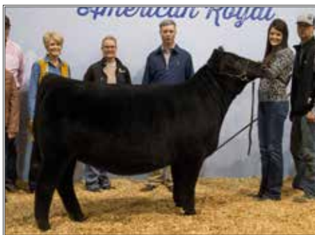
CRSS LADY DONE IT 2017 AMERICAN ROYAL GRAND CHAMPION PUREBRED SIMMENTAL HEIFER

A pair of high end ET flushmate sisters from the American Royal champion herself, CRSS Lady Done It. Since her time in production for Bar O Cattle Company, she has become an integral part of the program and her influence will remain everlasting. In terms of udder quality, mature cow size, and functionality this cow family sets the pace. The two females being offered are sired by the popular 2021 Cattlemen's Congress Reserve Grand Champion Simmental Bull, WHF/JS/CCS