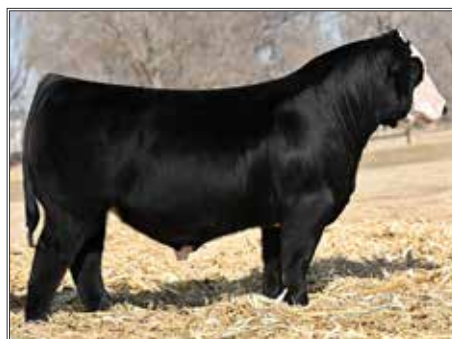
W/C BANK ON IT 273H $202,000 SIRE OF LOT 24

JARR Karolina K203 is one of the first daughters of the $202,000 W/C Bank On It 273H, a past high seller at Werning Cattle Company that is from the famed KS Miss Sequoia Y770 matron. This bald faced beauty has been turning heads since day one, and there is no denying that the presence and quality that she offers is simply unrivaled. The dam of K203, LKCC Miss Perfect 5G, is sired by Perfect Vision 26D, the full brother to the legendary MR CCF 20-20 that is a resident herd sire at Kersten Cattle Company. 5G is further supported by the maternal prowess that is predicted by the influence of the of late and great WAGR Driver 706T. K203 is a must see on sale day if you're in the market for a big time Purebred!