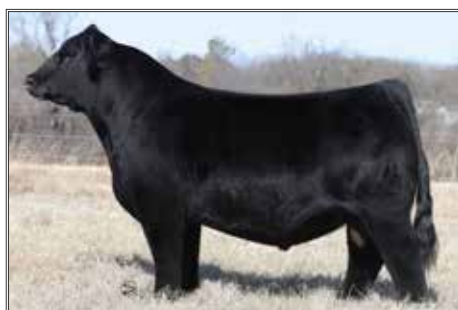
WHF/JS/CS DOUBLE UP G365 SIRE OF LOTS 17A & 17B