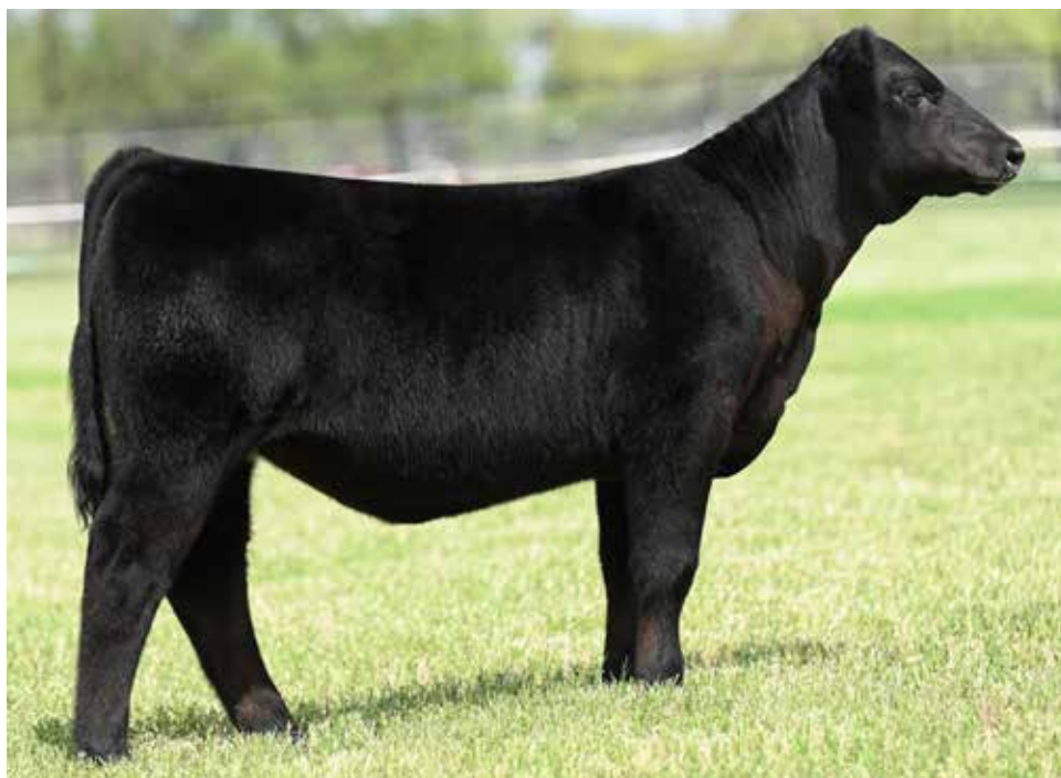
RIM KNOCKOUT 46K ET OFFERED BY RIMPEL SHOW CATTLE

46K is so sleek about her front third, clean chested, smooth shouldered, and sets to the surface with authority. Study the turn and the shape to her center body, she has the right parts and pieces to mature into a highly successful show heifer for any junior exhibitor! Entered in the 2022 American Royal.