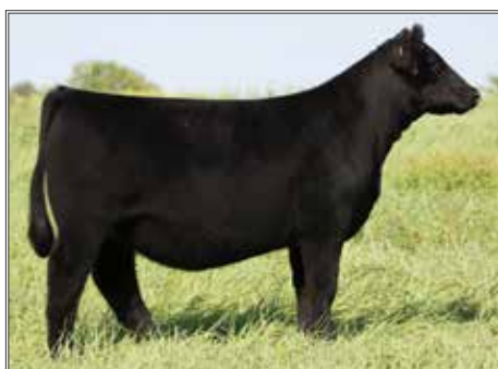
BAR -O- GUCCI 915G $18,500 PATERNAL SISTER TO LOT 16