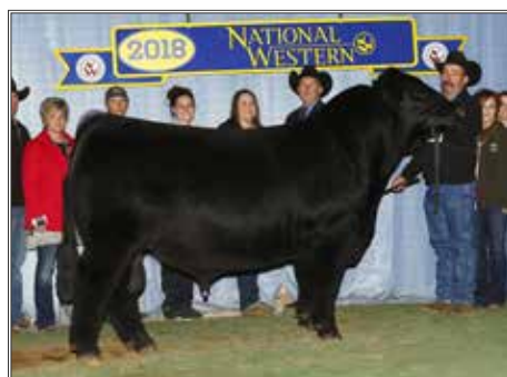
BOE EPIC SIRE OF LOT 34 2019 NWSS GRAND CHAMPION MAINE-ANJOU BULL