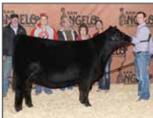
J&J PRINCESS 619 DAM OF LOT 32 2018 SAN ANGELO STOCK SHOW GRAND CHAMPION ANGUS HEIFER