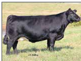
LLSF ROBINS KISS Y251 3RD GENERATION DAM OF LOT 4