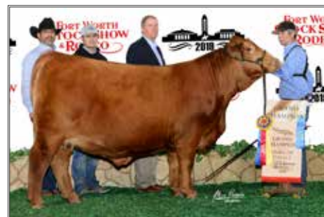
LMC SSC CATALINA 5D/307 2019 FWSS GRAND CHAMPION SIMBRAH HEIFER FULL SISTER TO LMC SSC ANGELO 852F