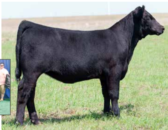
SWC NFFS KIMBER 2011K OFFERED BY SHIPWRECK CATTLE CO & NIXON FAMILY FARMS