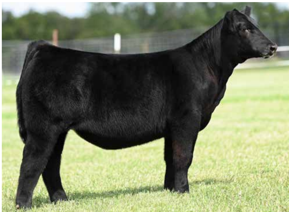
RIM KALEIDOSCOPE 5423K ET OFFERED BY RIMPEL SHOW CATTLE

RIM Knockout 46K ET is the younger maternal sister to 26K that is sired by the late Daddy's Money 55Z, an industry leading sire that needs little introduction. This mid-April High Maine-Anjou show heifer prospect is a tick greener in terms of condition, but that doesn't take away one bit of the quality and futuristic look that she brings to the table!