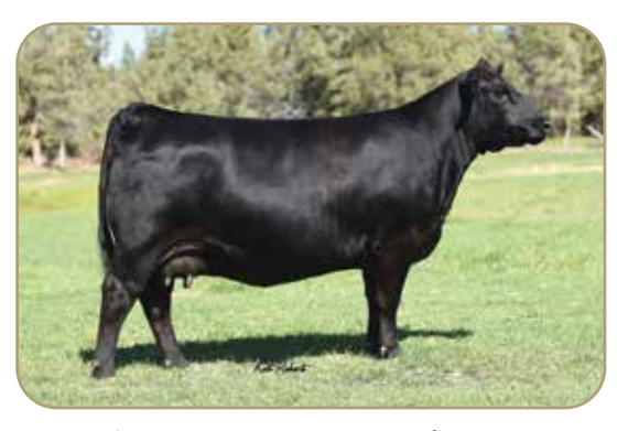
Silveiras Princess 6358 - Dam of Lots 7 - 9