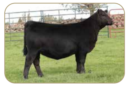
K Bar D Wendy 5J $42,000 Full sister to Lots 3A & 3B