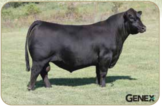
Stevenson Turning Point - Sire of Lot 4