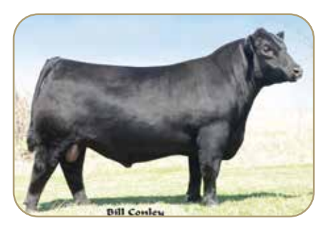
B C Lookout 7024 - Sire of Lot 10