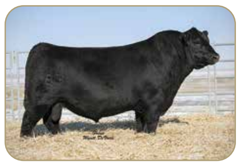
BUBS Southern Charm AA31 - Sire of Lot 9