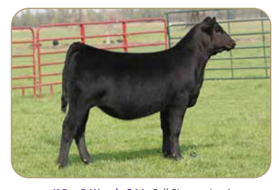
K Bar D Wendy 86J - Full Sister to Lot 4