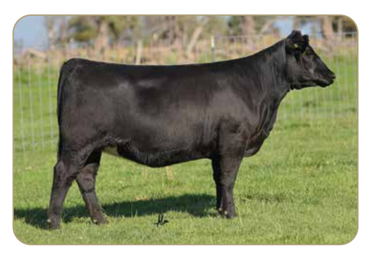
LOT 16 - K BAR D WENDY 81J

AI BRED 6/4/22 TO KR Mojo 8520 (19219146). PE 5/28/22-7/25/22 TO K Bar D Western Charm 37J (20295149). SAFE AI. ESTIMATED DUE 3/13/23.