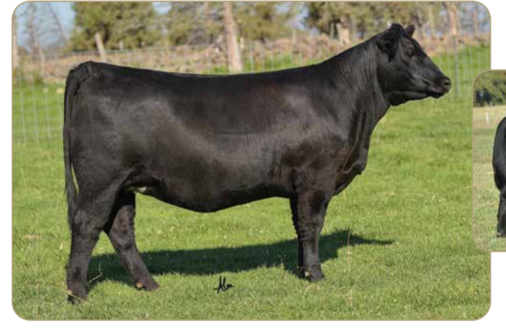
LOT 21 - K BAR D WENDY 42J