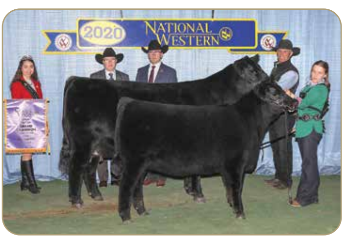
K Bar D Wendy 151E - 2020 ROV Champion Pair Dam of Lots 2 - 4