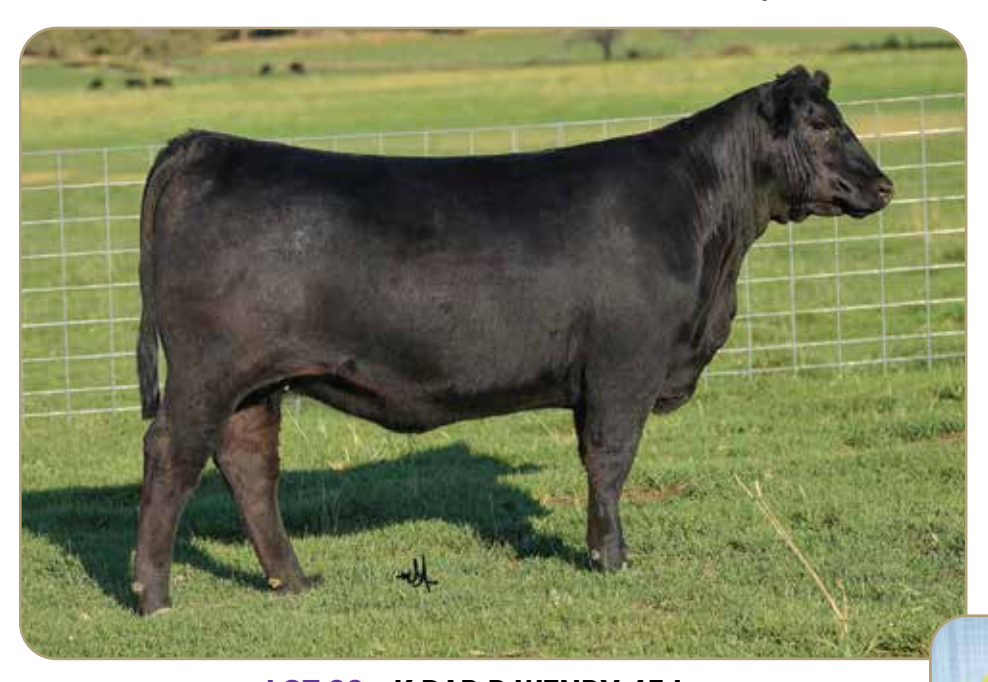
LOT 22 - K BAR D WENDY 45J