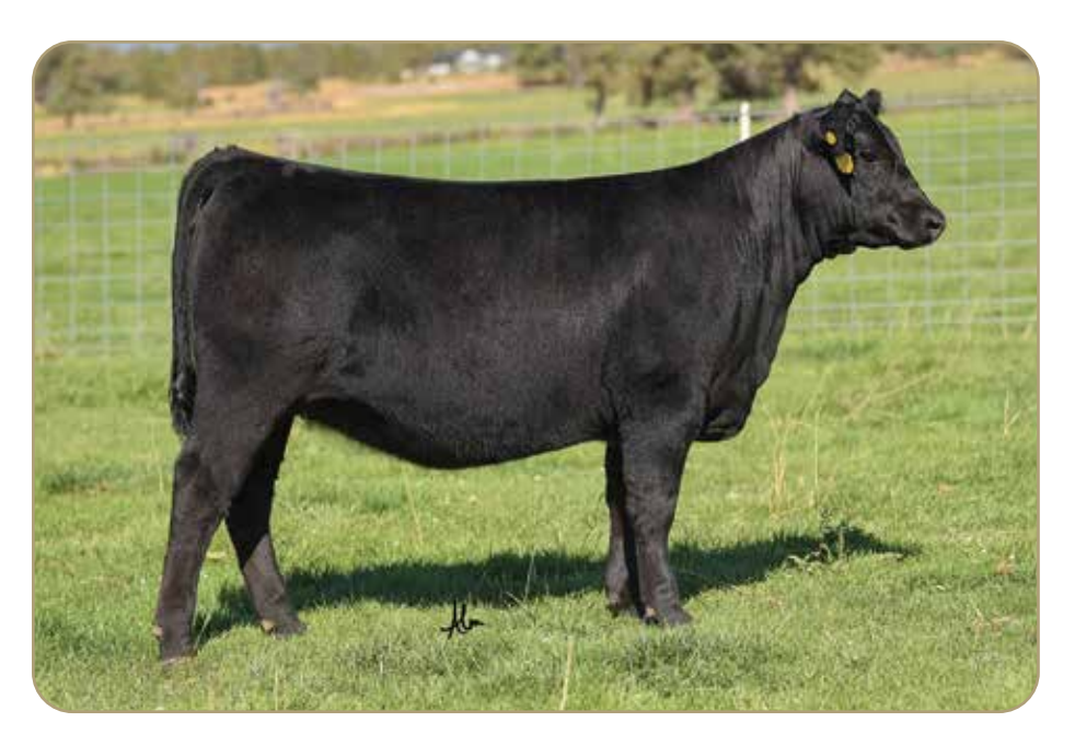
LOT 11 - K BAR D SAVANNAH 9K