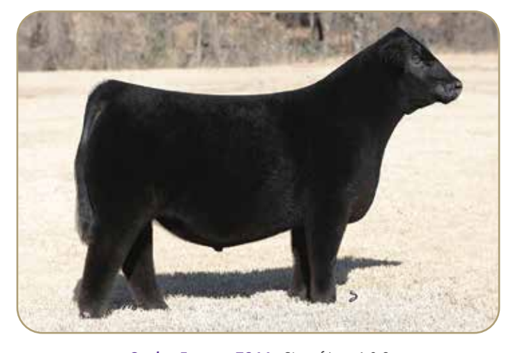
Conley Express 7211 - Sire of Lots 1 & 2