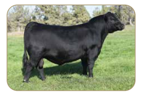
K Bar D On Point 25F - Sire of Lots 11 - 14