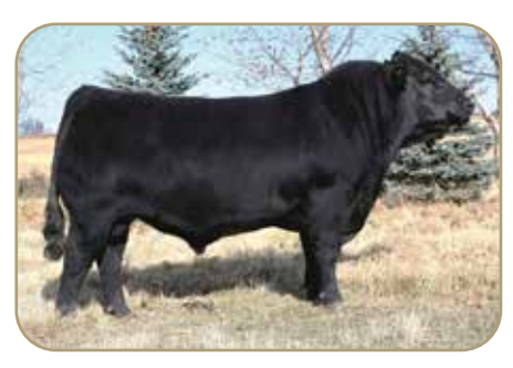
HF Tiger 5T Maternal Grandsire of Lot 13