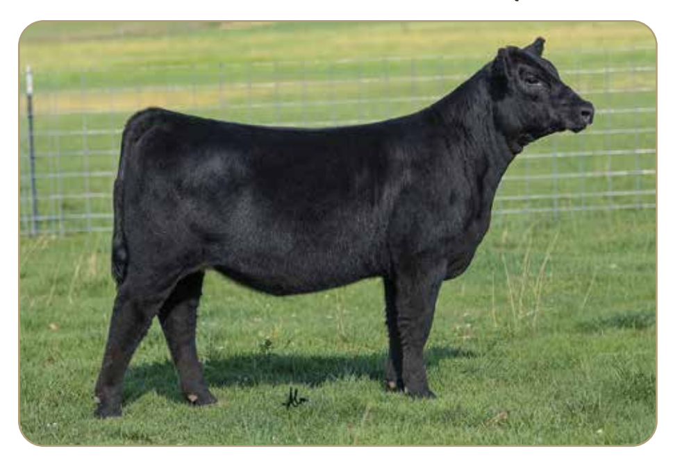
LOT 10 - K BAR D ERIKA 1K