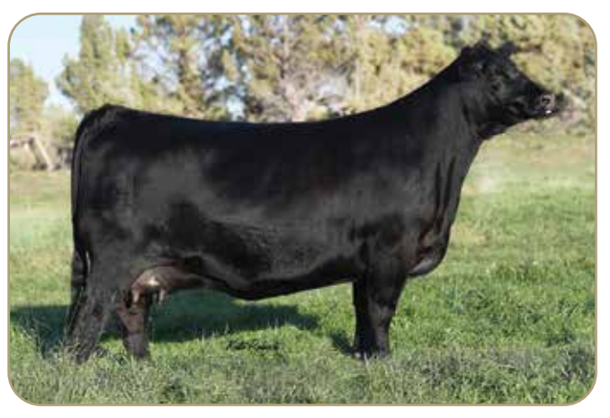
K Bar D Wendy 151E - Dam of Lot 15

AI BRED 4/12/22 TO Kraye Big Country 0179 (19902000). PE 5/28/22-7/25/22 TO K Bar D Western Charm 37J (20295149). SAFE AI. ESTIMATED DUE 1/19/23.