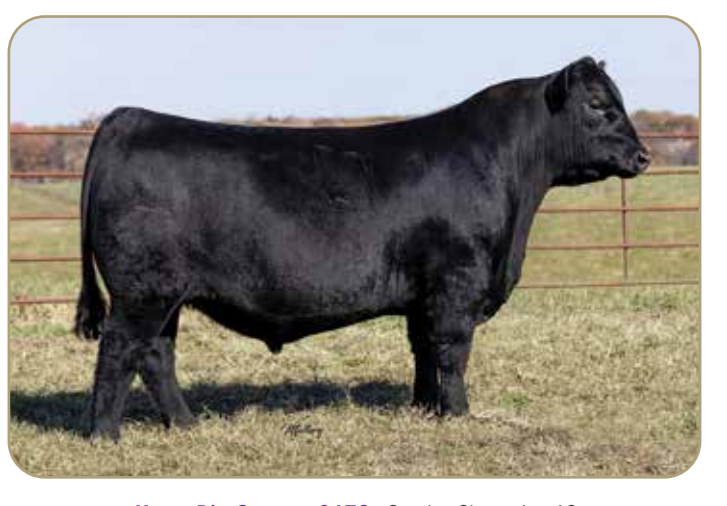
Kraye Big Country 0179 - Service Sire to Lot 19

AI BRED 4/6/22 TO Kraye Big Country 0179 (19902000). PE 5/28/22-7/25/22 TO K Bar D Western Charm 37J (20295149). SAFE AI. ESTIMATED DUE 1/3/23.