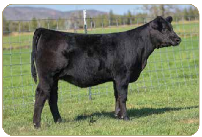
LOT 14 - K BAR D BLACKCAP 29K