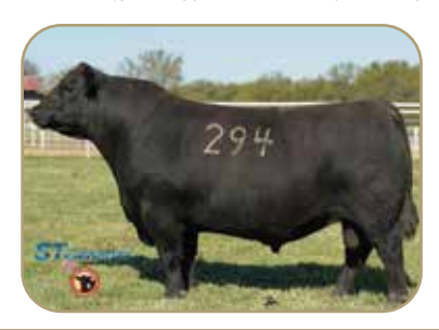
J&J Weigh Up 294 Sire of Lot 5