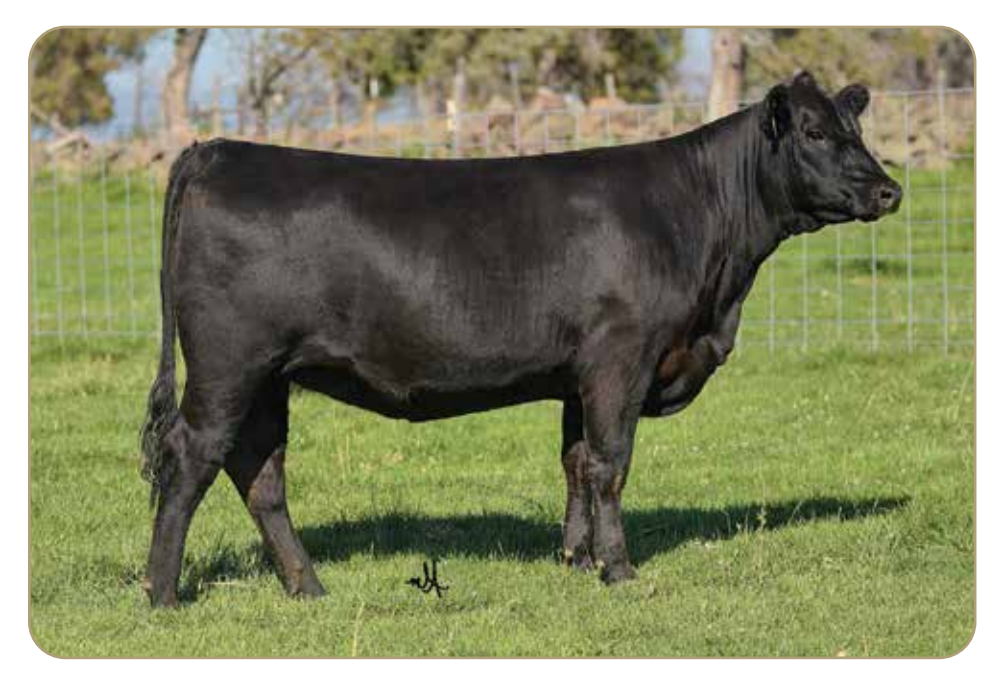
LOT 28 - K BAR D ELAINE 57J