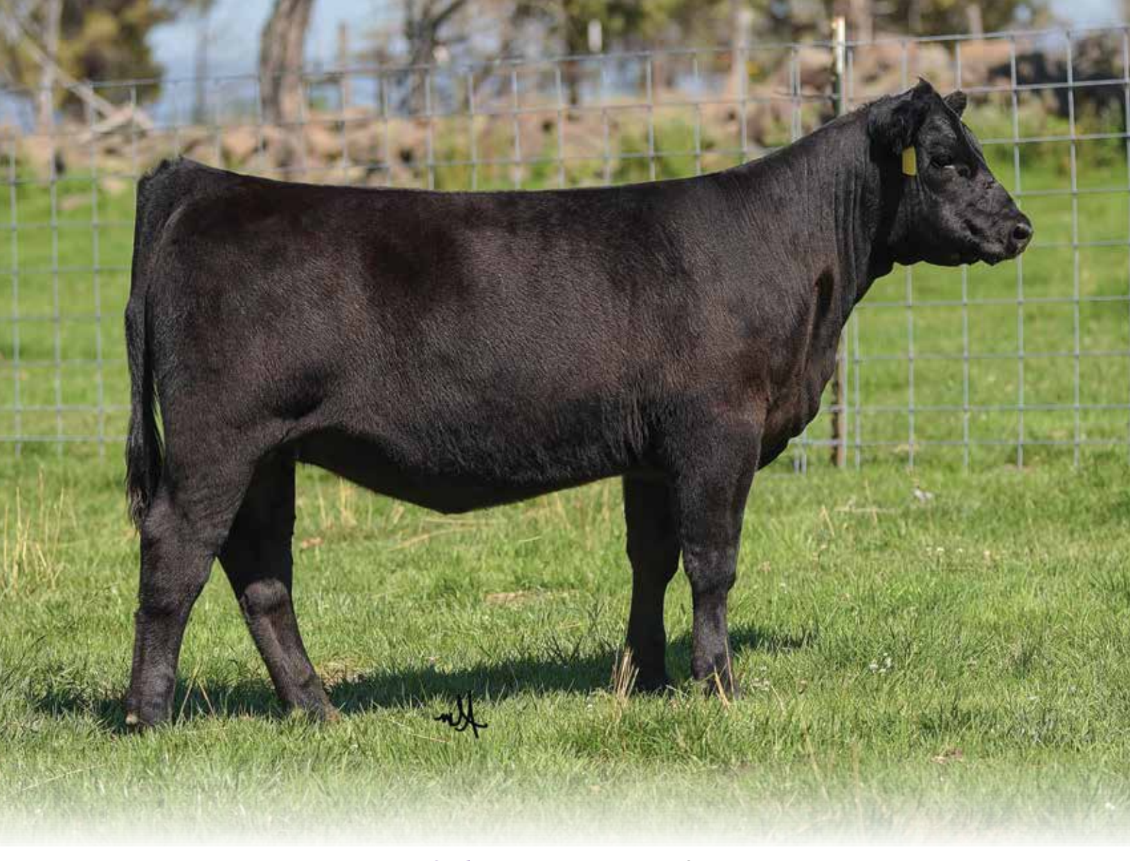
LOT 1B - K BAR D WENDY 72K