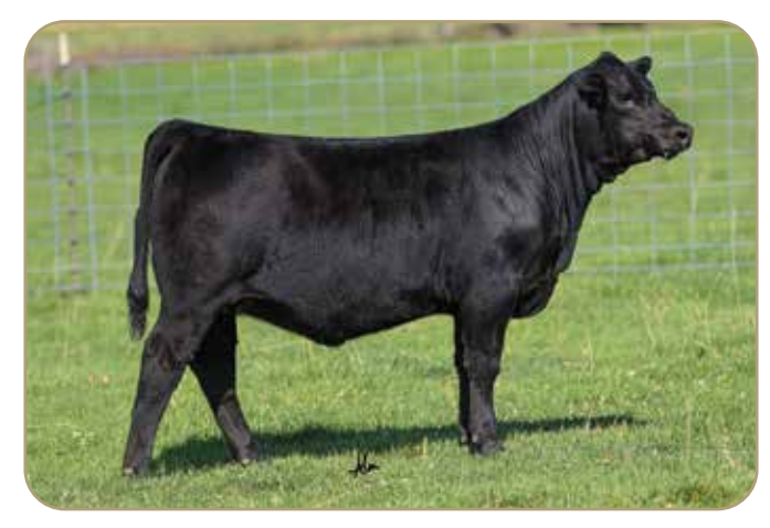
LOT 13 - K BAR D DOLLY 27K