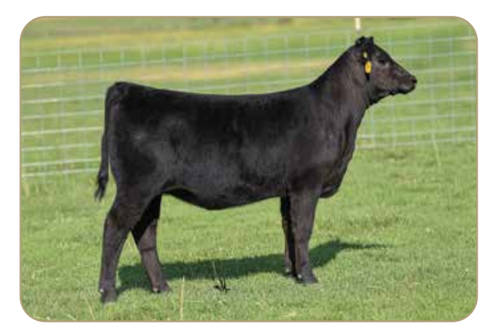
LOT 12 - K BAR D NATURAAL 39K