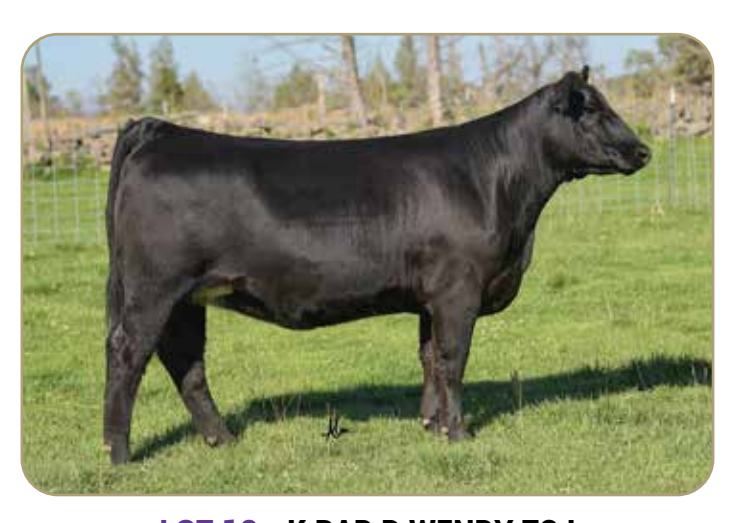
LOT 18 - K BAR D WENDY 73J

Al BRED 4/6/22 TO Kraye Big Country 0179 (19902000). PE 5/28/22-7/25/22 TO K Bar D Western Charm 37J (20295149). ESTIMATED DUE 3/10/23.