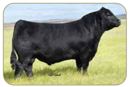
KR Mojo 8520 Sire of Lots 3A & 3B