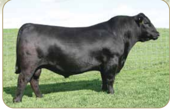
S A V Bismarck 5682 - Sire of Lot 7