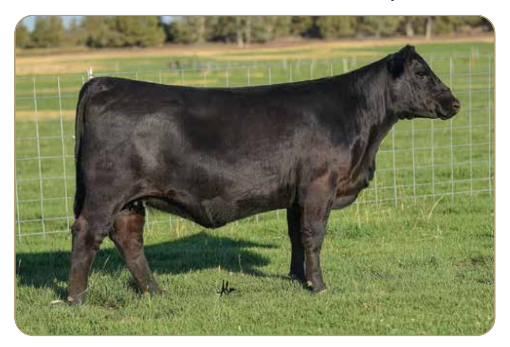
LOT 20 - K BAR D WENDY 41J