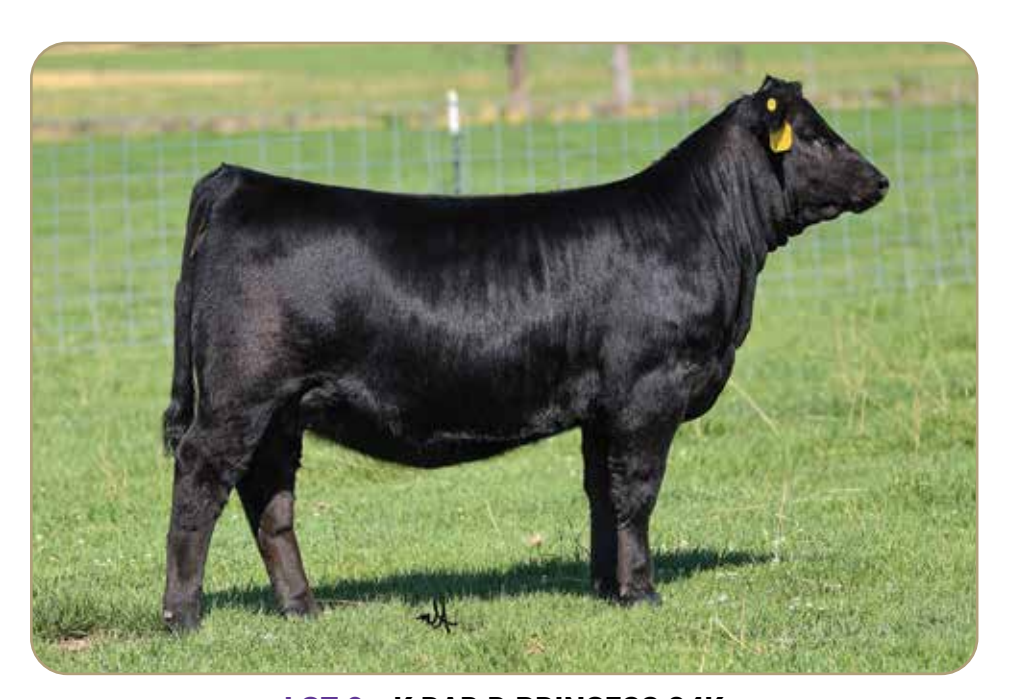
LOT 9 - K BAR D PRINCESS 24K