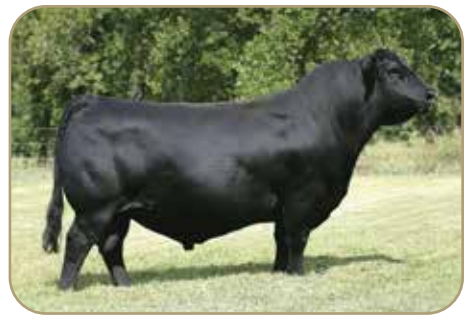
BC Robust 0807 - Service sire to Lot 28