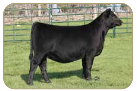
K Bar D Wendy 6J $30,000 Full sister to Lots 3A & 3B