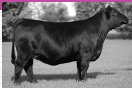
CLRS DAIRY QUEEN 606D - Dam of Lots 2 - 4