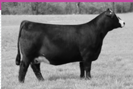
JS BARB 57F - Full Sister to Lot 10