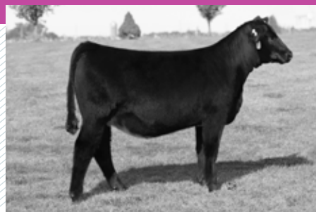
JS DAIRY QUEEN 31J - $15,000 Full Sister to Lot 2