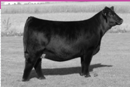
JS DAIRY QUEEN 57G - Dam of Lot 1