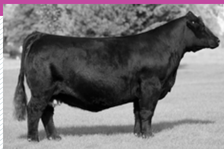
$230,000 Promotional AI Sire produced by "Boots"