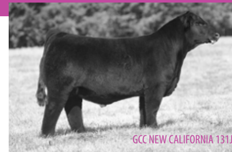
GCC NEW CALIFORNIA 131J