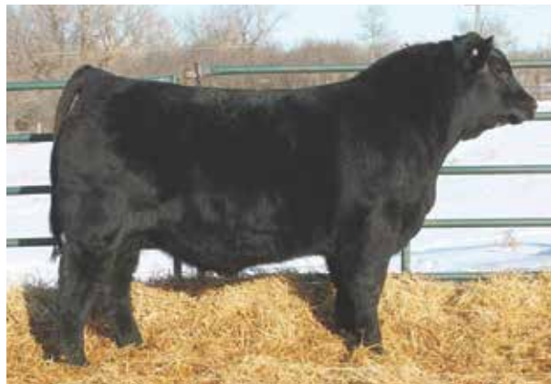
PEAK DOT UNANIMOUS 586B Paternal Grand sire of Lots 24-26

Smoky Y Grantland J139 is another son of Six Mile Grantland 270G that is backed by the influence of PIE One Of A Kind 352 that traces to the maternal legend Red MRLA 61X herd sire. There is no denying the maternal excellence that lines his pedigree. A moderate birthweight bull that could be used in a series of different breeding scenarios.