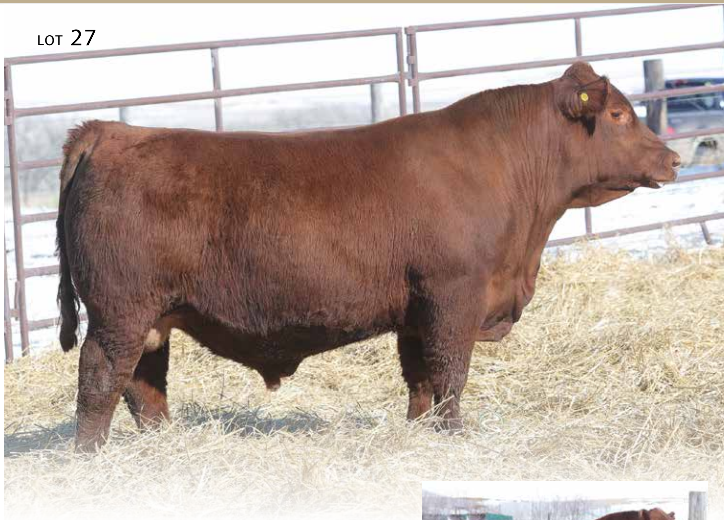
SIX MILE RUSTY 230G - Sire of Lots 27-32