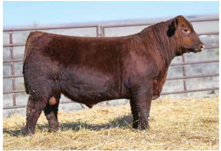
SMOKY Y ATOMIC 8160F - Maternal Brother to Lot 94

Smoky Y Code Red J80 leads off the Smoky Y Code Red 7309 sire group. He is backed by Smoky Y Julie 1600D, the dam of Smoky Y Atomic 8160F who was purchased by McMurphy Farms of Oklahoma a few years ago. J80 offers tremendous carcass data as he recorded an IMF Ratio at 125 with a REA Ratio at 105.