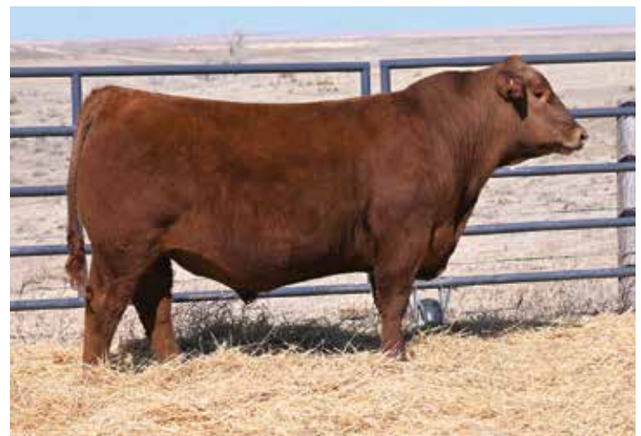
SMOKY Y JAX G622 - Maternal Brother to Lot 10

This age advantage son of Return Policy is big topped, thick ended, and offers a 15+ inch REA to compliment his performance data. The dam of 176H is a productive daughter of Red Windy Hill Zeppelin 1240, that also raised Smoky Y Jax G622.