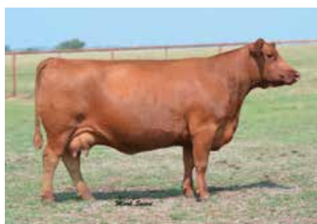
A-1 SIERA INDEED 549X Dam of Lot 107