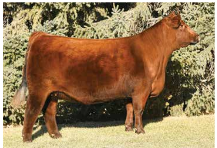
ROJAS NAVARRE 6054 - Paternal Granddam of Lots 1-7

Smoky y Magnitude 172H is a massive bodied, deep dark red stud that is sired by Rust Trump 400E. The dam of this powerful herd sire prospect is a top young daughter of Red SSS Traverse 387Z. He is a low input, easy fleshing bull that is smooth made, and offers an eye appealing look from every angle. A true herd sire prospect that offers balanced numbers to compliment his genuine mass and density.