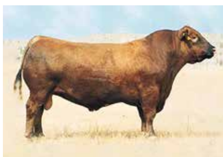
LMAN KING ROB 8621 32 Year old Sire of Lot 107

We saved a retro pedigree to close out the 2022 offering, and there is no denying the consistency, quality, and maternal excellence that has influenced the breed for over 3 decades! We went way back into the semen tank to use LMAN King Rob 8621, an influential herd sire that would be 32 years old if he was still alive today! Help yourself to a pedigree that will simply never go out of style!