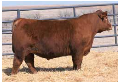
SMOKY Y OUTBACK 64H Maternal Brother to Lot 92

J50 is another bull that comes from the Regulator x Mulberry genetic combination. This stout made, long bodied herd sire prospect charts top third of the business for WW. He posted a WW Ratio at 103.