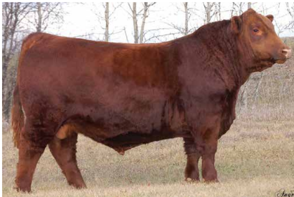
RED LAZY MC HOLLYWOOD 127C - Sire of Lots 104 &amp; 105