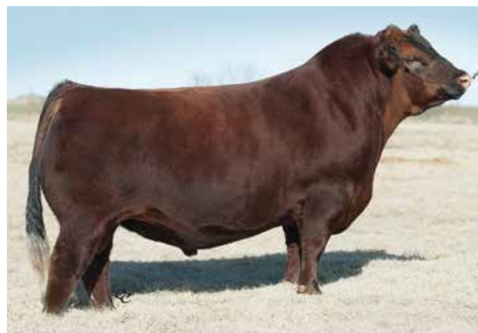
ROJAS RIOJA 6052 - Full Brother to Paternal Granddam of Lots 1-7

Smoky Y Trump 166H is a high calving ease, low birth weight son of Rust Trump 400E that is backed by a productive Feddes Oscar X28 daughter. He offers a moderate birth weight to compliment his breed leading calving ease. Recommended for use on heifers.