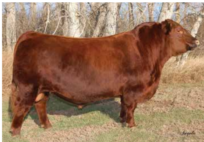
RED NCJ LAZY MC VENOM 34Z - Sire of Lots 34-40

POWERHOUSE ALERT! Ladies and Gentlemen, they cannot all be lot 1, but they can certainly have the quality to warrant this position in the catalog. Smoky Y Full Deck J52 is a tremendous bull both phenotypically and numerically. This lead off son of Red NCJ Lazy MC Venom 34Z is as dense bodied, stout ended, and three-dimensional as you can design one, all the while maintaining a build that is second to none. We love the functionality, efficiency, and masculinity that this herd sire prospect offers. He charts top 10% ProS, top 17% HB, top 21% GM, top 1% DMI, top 18% WW, and top 24% CEM. He posted a WW Ratio at 106 and a YW Ratio at 109. The dam of J52 is a productive Traverse daughter that has put several females back into the herd at Smoky Y Ranch. Pay close attention here... a sale feature!