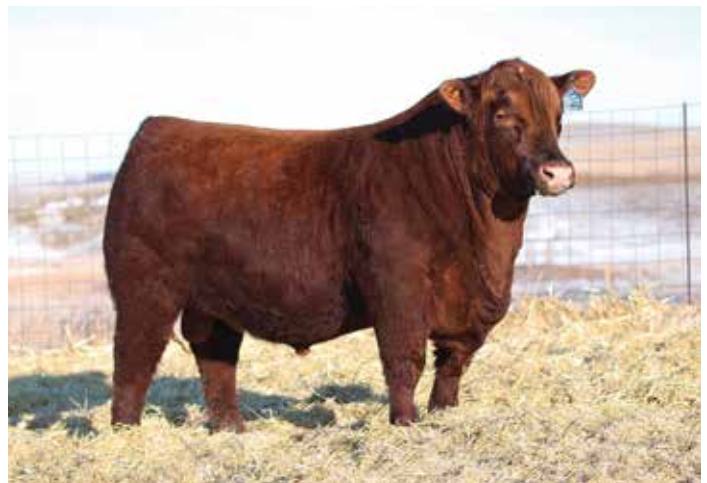
NCJ COMING IN HOT 24E - Sire of Lots 12-17

Smoky Y Inferno J69 is a great built son of NCJ Coming In Hot 24E, the outcross stud that traces to the RRA Aviator 507 influence. The bottom side of his pedigree combines Red SSS Bedrock 68H, descending from the Windy Hill Stockman cow family. A balanced herd sire prospect that boasts a REA Ratio at 105.