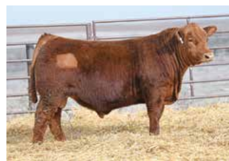
SMOKY Y CAST IRON 8107F Maternal Brother to Lot 107