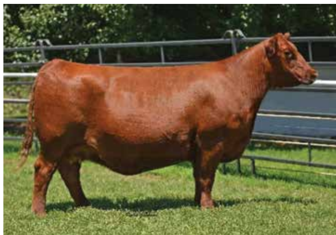
RED BRYLOR JESSIE 33W - Paternal Granddam of Lots 74-82