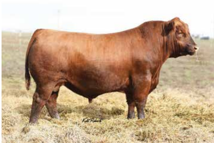
TJS ROAD BLOCK D008 - Sire of Lots 66-68