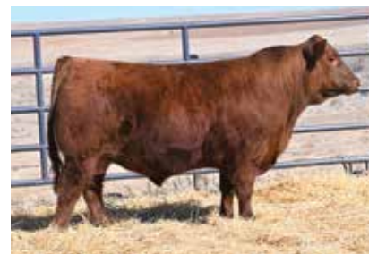
SYR FUSION 53H Maternal Brother to Lot 43