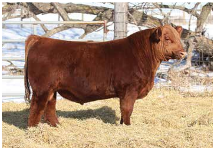
SIX MILE GRANTLAND 270G - Sire of Lots 24-26

We purchased the sire of the next three bulls from the Six Mile program to add an outcross pedigree component to our program. Six Mile Grantland 270G is the red hided stud that is sired by Peak Dot Unanimous 586B, the exciting black herd sire that Six Mile Ranch acquired from the famed Peak Dot Ranch. The structural integrity, foot shape, and depth of heal that this sire group brings to the table is hard to mimic. Smoky Y Grantland J102 is a standout among this set of bulls with his added dimension, shape, and performance. He came to the weaning pen with a WW Ratio at 104, a YW Ratio at 101, an IMF Ratio at 104, and a REA Ratio at 109. His two-year-old dam hit it out of the park during her rookie season of production. The granddam of J102 is also the dam of Smoky Y Full Deck J52, the lead off bull from the Venom sire group! Consistency, uniformity, and quality is bred into his pedigree... you can count on it!