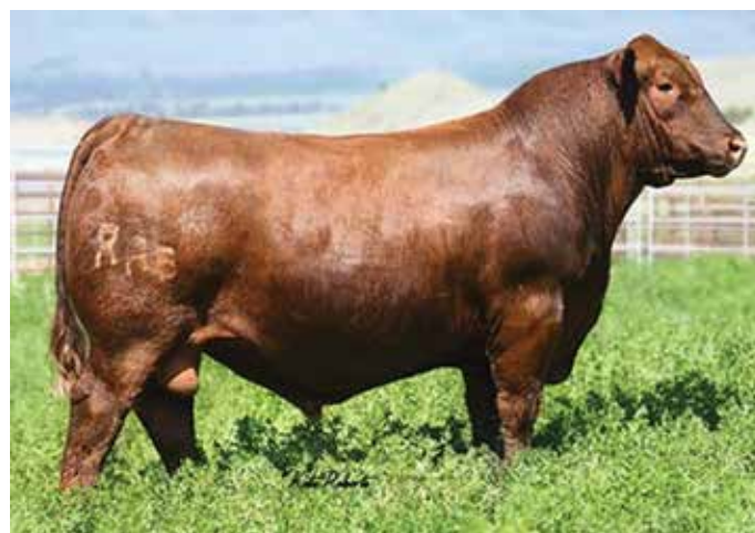
BIEBER SPARTAN E639 - Sire of Lots 47-54