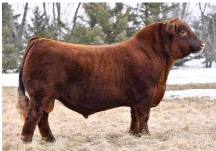
MCKY 8731 ET "JOSEY WALES" - Sire of Lots 74-82

In 2020 we made the trip to the National Western Stock Show to check out what new genetics were surfacing within the industry. When we walked through the barns on the hill at the NWSS we were quick to identify MCKY 8731 "Josey Wales" as one of the stoutest and most unique Red Angus herd sire prospects that we had ever laid eyes on! We had to use this bull in our breeding program, and that is exactly what we did. The dam of MCKY 8731 is the stunningly beautiful Red Brylor Jessie 33W matriarch that is a foundation breeding piece for McKay Cattle Company of Oklahoma. J72 is a prime example of what we were hoping to generate by utilizing the service of 8731. Moderate framed, square built, and dense from end to end. This big scrotal herd sire prospect exemplifies the herd sire fundamentals of body mass, muscularity, and structural integrity. He charts top 7% ProS, top 1% DMI, top 8% HB, and top 22% Stay. He posted a WW Ratio at 105, a YW Ratio at 106, and a REA Ratio at 110. A standout from every aspect!