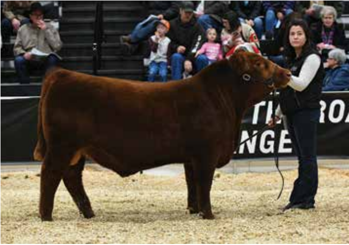
SIX MILE RUSTY 230G - Sire of Lots 27-32