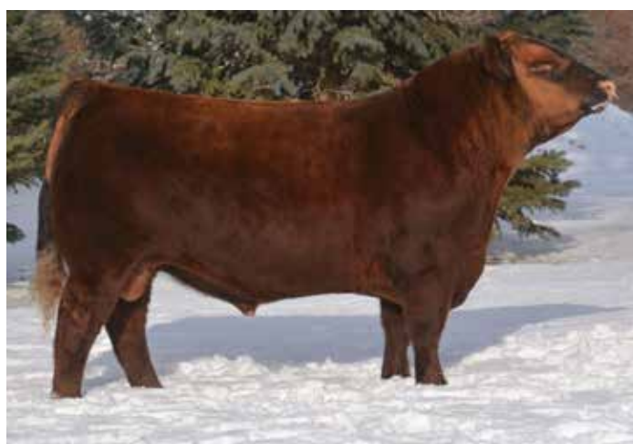
DAMAR TRUMP C512 - Paternal Grandsire of Lots 1-7

Smoky Y Trump 173H leads the way in terms of mass, power, and substance, with the added length and eye appeal that we admire. We selected Rust Trump 400E from Rust Mountain View Ranch, as he combined two of the most elite individuals in the Red Angus breed. 400E is sired by Damar Trump C512 and backed by the National Champion female, Rojas Navarre 6054. The paternal granddam of this set of bulls is an ET flushmate to the widely used and popular AI sire, Rojas Rioja 6052. 173H posted a WW Ratio at 104, a YW Ratio at 109, an IMF Ratio at 126, and a REA Ratio at 108.