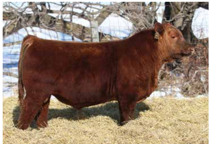
SIX MILE COMIN IN HOT 304G - Sire of Lots 18-23

A true sale feature to lead off the Six Mile Comin In Hot 304G sire group! J81 has been a standout since day one, and it comes to no surprise that he is backed by a role model daughter of PZC TMAS Red Sky 2794, one of the great breeding bulls that has influenced our program for nearly a decade. Two sisters to J81 have been retained in herd and there is no denying the quality that this cow family represents. J81 exhibits tremendous length and extension, a bold rib cage, and sets to the surface with confidence. He records a WW Ratio at 103, and an IMF Ratio of 107. Performance, eye appeal, and structural integrity all in one package!