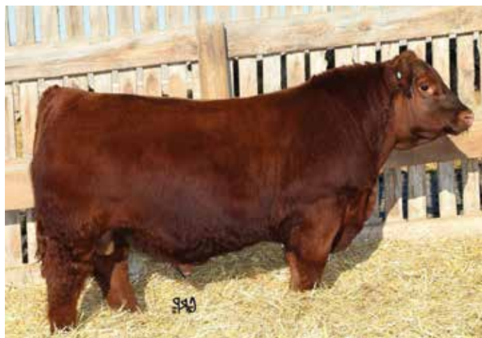
RED U-2 RENOWN 193C - Sire of Lots 41-46