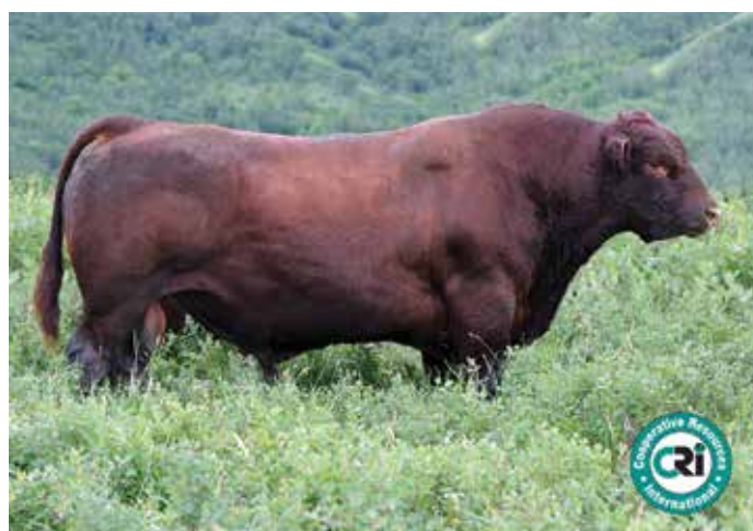
RED CROWFOOT MOONSHINE 8081U - Sire of Lots 55-56 & Paternal Grandsire of Lots 57-65

We have sampled several bulls over the years that have left a true legacy on the business. Red Crowfoot Moonshine 8081U is a prime example of what a Red Angus beef bull should look like. Tremendous length, depth, thickness, and a bull that consistently sires cattle with a look of quality and eye appeal. Moonshine has experienced heavy use at the Smoky Y Ranch because of the udder quality, maternal excellence, and longevity that he injects into his daughters. J27 and J26 are both direct sons of the now deceased Moonshine. J27 offers tremendous eye appeal and style, with the signature Moonshine hip and hind leg design. We love his length, depth of rib, and proud presence that he exudes. J27 recorded a WW Ratio at 107, YW Ratio at 109, and a REA Ratio at 101. Help yourself to one of these Moonshine sons, you will love the daughters you keep back as replacements, we guarantee it!