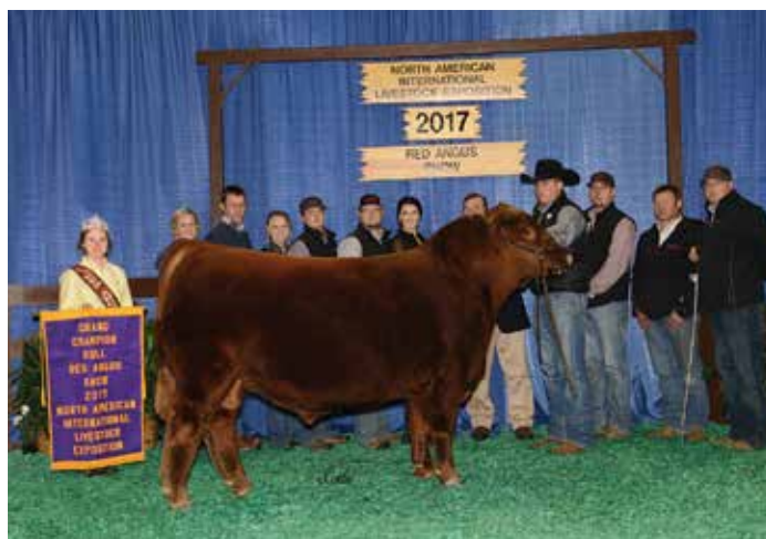
TC RETURN POLICY 42D - Sire of Lots 8-11

Undoubtedly one of the true standout herd sire prospects to be offered in the Red Angus breed this spring! Smoky Y Robust 164H offers a build and body style just as his name implies. This lead off son of the NAILE Grand Champion, TC Return Policy 42D, is massive in terms of his rib cage, big ended, and square built. The dam of Robust is a productive young daughter of PZCTMAS Red Sky 2794. A must see on sale day if you're serious about adding an elite herd sire to your bull battery!