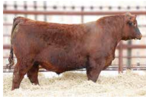
RED SSS TYCOON 225E Sire of Lots 69-73

J124 is a performance standout within the Red SSS Tycoon 225E sire group as he ranks among the top 11% for WW, top 17% YW, and top 30% ADG. He offers tremendous marbling with a 5.38 adjusted IMF.