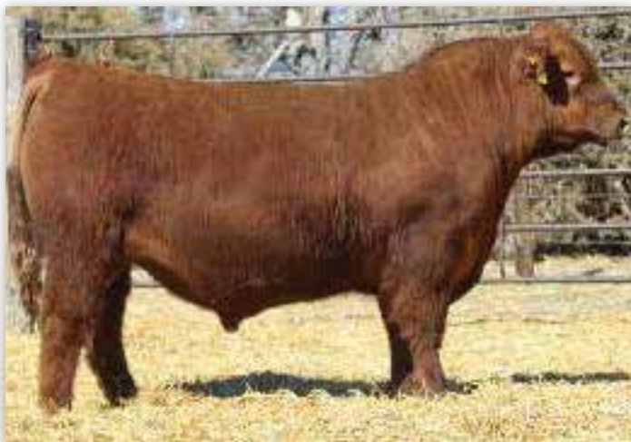
PIE CONVOY 7058 - SIRE OF LOTS 50 - 52

0251 is a smith made bull that offers a double digit CED to accompany a -3.2 BW EPD. He is a viable option for use on well managed heifers.