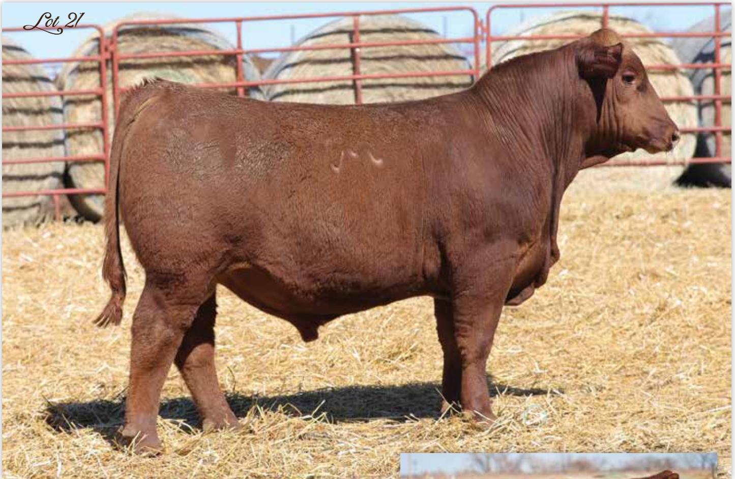
MF RAMBLER 7191 - SIRE OF LOTS 20- 21

0353 and 0343 are paternal brothers sired by MF Rambler 7191 and both backed by the Optimism influence on the maternal side of their pedigree. MF Rambler 7191 was our selection from the McMurphy Farms program of Alva, Oklahoma. 0343 charts top 5% HB and top 1% Stay. 0353 ranks among the elite 1% of the breed for ProS, top 10% HB, top 1% GM, top 22% WW, top 10% YW, top 4% ADG, top 10% Stay, top 7% Marb, top 2% CW, and top 2% Fat. A powerful pair of powerful Rambler sons that are ready for heavy service!