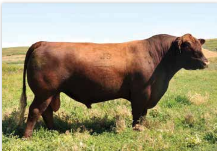
C-BAR ELDORADO 114Z - PATERNAL GRANDSIRE OF LOT 19

4MC Grande 0352 is an own son of the great C-Bar El Grande 100C herd sire that walks at Pieper Red Angus at Hay Springs, Nebraska. El Grande is the Anticipation sired son of the breed leading carcass dam, T715. 0352 charts top 28% ProS, top 11% HB, top 10% Stay, and top 31% Marb. An eye appealing, sound built, smooth made herd sire prospect that deserves serious consideration on sale day!