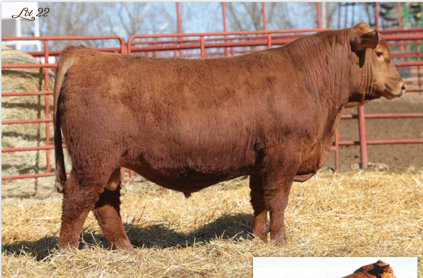
9 MILE BLOCKOUT 7102 - SIRE OF LOTS 22 - 29