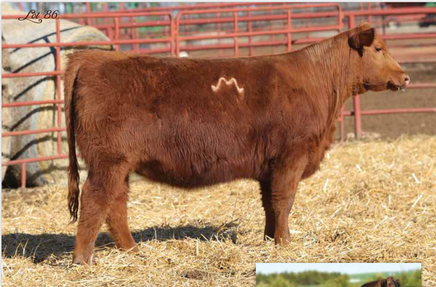
9 MILE FRANCHISE 6305 - SIRE OF LOTS 85 & 86