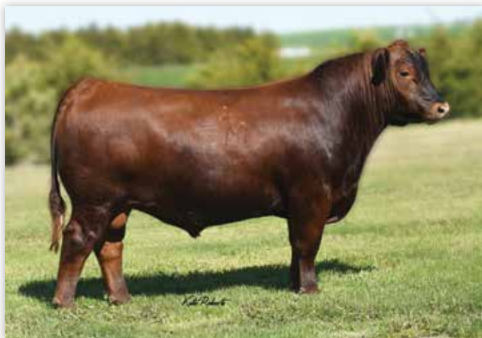
9 MILE FRANCHISE 6305 - SIRE OF LOTS 30 - 32

4MC Franchise 0110 is the lead off son of the $105,000 9 Mile Franchise 6305. His dam is a top producing daughter of 4MC Godfather 230. He ranks top 14% BW, top 2% Milk, top 7% CEM, top 23%G, and top 25% REA. This combined with a moderate 62 pound actual birth weight makes him a top candidate for use on heifers.