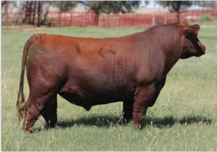
PIE NEW TERRITORY 523 - SIRE OF LOT 13 & 14