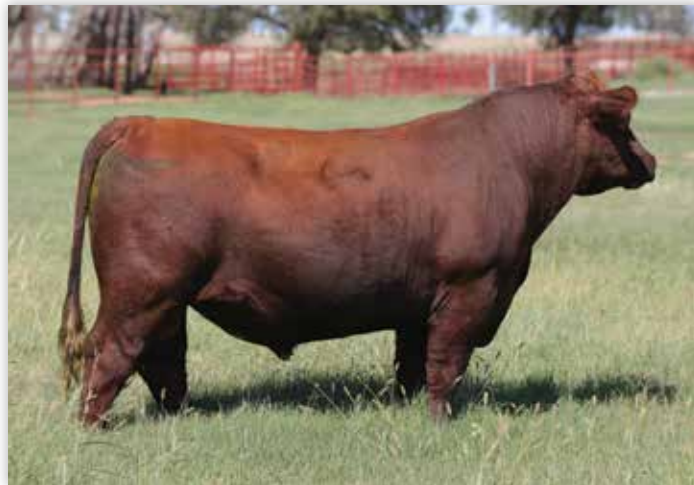
PIE NEW TERRITORY 523 - SIRE OF LOTS 75 - 78