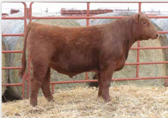
4MC NEW TERRITORY 8106 - SIRE OF LOT 56

4MC New Territory 0157 is a true sale feature and one that we encourage you to study in the flesh on sale day. Sired by resident herd sire, 4MC New Territory 8106, the powerful son of PIE New Territory 523 and backed by the Monu 550 matron. Here is a moderate framed, dense, bold bodied beef bull that is sure to leave behind a sensational set of daughters that excel in terms of fleshing ease and longevity. He charts top 15% GM, top 22% WW, top 20% YW, top 20% ADG, top 17% Marb, and top 20% CW.