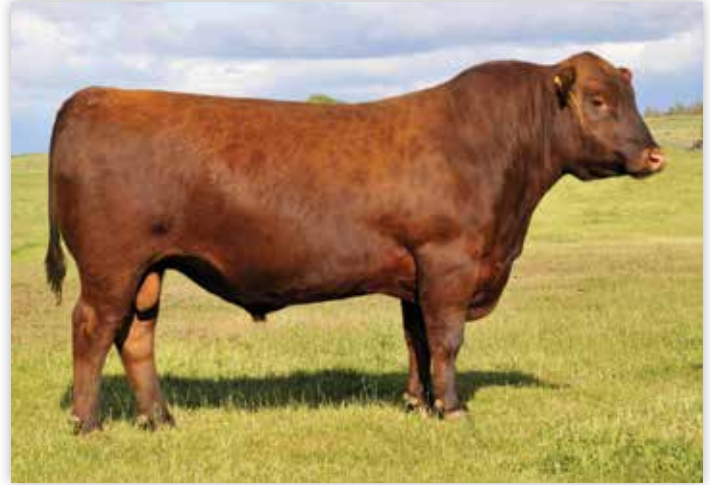
LSF PROSPECT 2035Z - PATERNAL GRANDSIRE OF LOTS 15 & 16