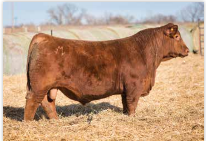
MF RAMBLER 7191 - SIRE OF LOTS 65 - 69

4MC Ms Jordan 0339 is a stylish and bold daughter of MF Rambler 7191, our selection from the McMurphy Farms program. 0339 is flawless at the ground with a tremendous set to her hip and hind leg. She is backed by a productive young daughter of PIE The Cowboy Kind 343. She is a true sale feature!