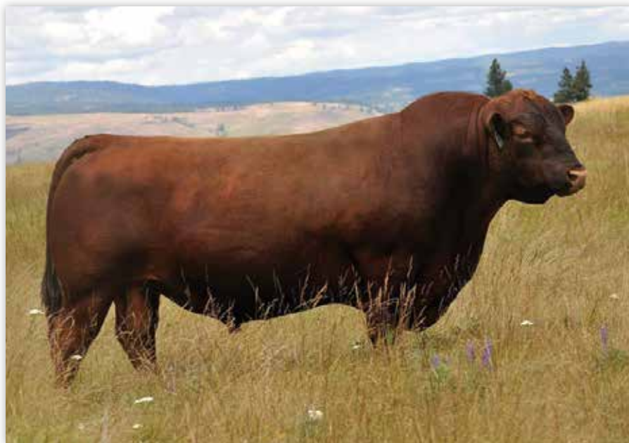
RREDS SENECA 731C - PATERNAL GRANDSIRE OF LOTS 33 - 42