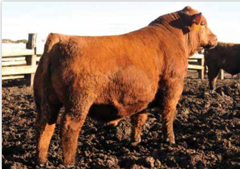
9 MILE BLOCKOUT 7102 - SIRE OF LOT 87