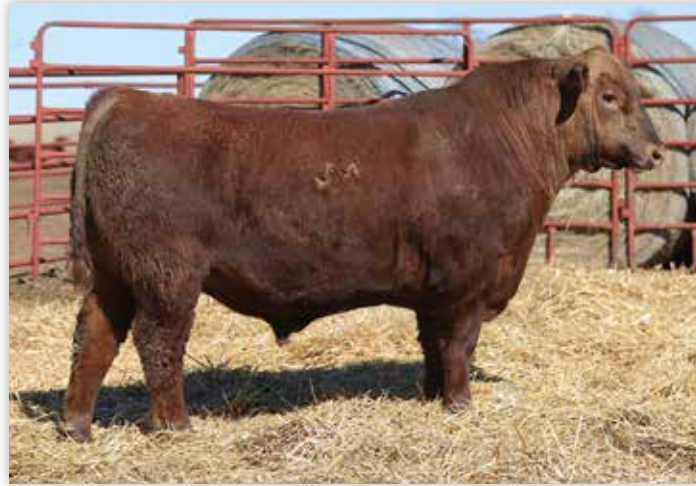
4MC CATTLEMAN 6112 - SIRE OF LOTS 8 & 9