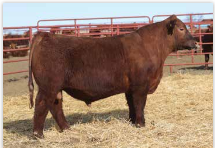
4MC TOP SHELF 766 - SIRE OF LOT 43

4MC Top Shelf 0160 is a tremendous son of 4MC Top Shelf 766, another standout from the Seneca sire line that was bred right here in Sweetwater, Oklahoma. The dam of 766 is the prolific PIE Boteet 0192 matriarch. 0106 ranks top 13% ADG, top 17% HPG, top, 14% YG, top 9% CW, and top 19% REA.