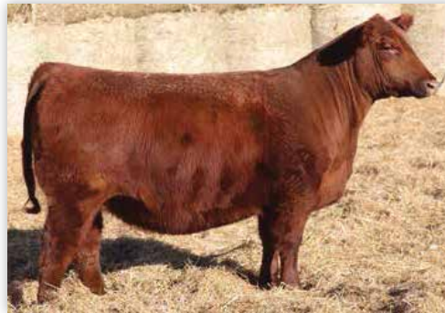
W/C MISS WERNING 3028G - PATERNAL SISTER TO LOT 17

We initiate the yearling herd sire offering with an own son of the industry leading 4MC King of the Cowboys 706. 0101 offers the same look, style, presence, and muscle expression as KOTC did just a few years ago when he topped our Partners in Progress Bull Sale. KOTC has sired countless high sellers across the industry for top programs in North America. KOTC is the sire of the 2020 NAILE Reserve Grand Champion Red Angus Heifer, 2021 Cattlemen's Congress Reserve Grand Champion Red Angus Heifer, and the sire of the $40,000 1/2 Interest bred heifer at Werning Cattle Company. Here is your opportunity to acquire an own son of KOTC for yourself! Bid with the utmost confidence.