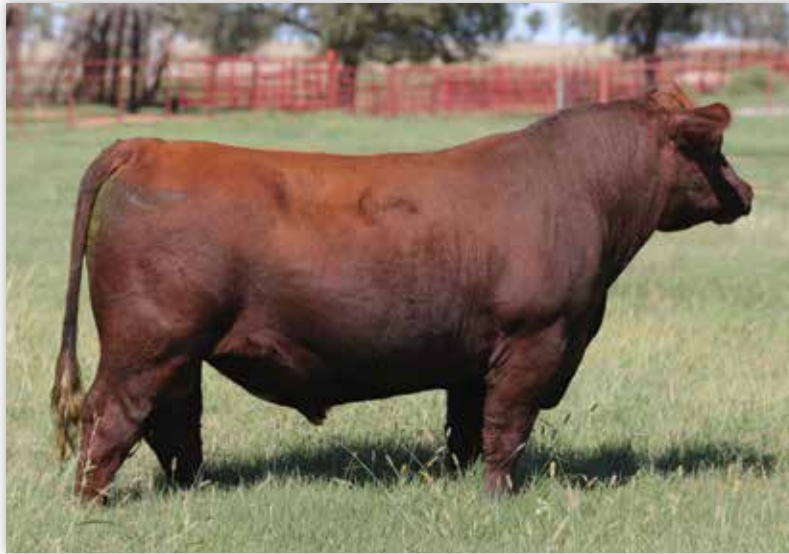
PIE NEW TERRITORY 523 - SIRE OF LOTS 57 - 59

The next trio of brothers are peas in a pod. Consistency is key if you are selling you feeder cattle at weaning time, and this set of paternal brothers can certainly add value to any operation that is looking to capitalize on the added premiums that a set of uniform red hided feeders can command. Performance, carcass quality, and feed conversion... this set of bulls checks all the boxes!