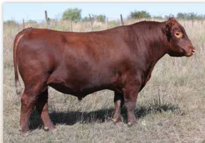
JEFFRIES REDDINGTON 865C - SIRE OF LOT 55

The lone son of Jeffries Reddington 865C in the yearling offering, but certainly one that deserves your attention and consideration. He ranks top 12% for GM and top 3% for CW. He is a moderate birth weight bull that boasts a negative BW EPD. A potential heifer bull candidate for well managed heifers.