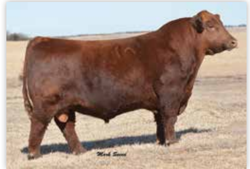
PIE THE COWBOY KIND 343 - SIRE OF LOT 18 & PATERNAL GRANDSIRE OF LOT 17