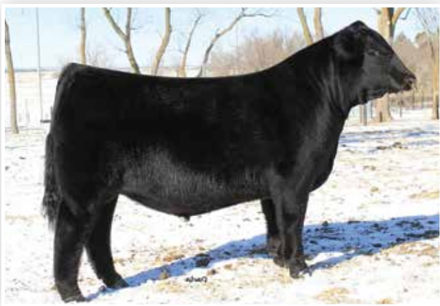
Lot 206A & 206B | RUBY`S CURRENCY 7134E