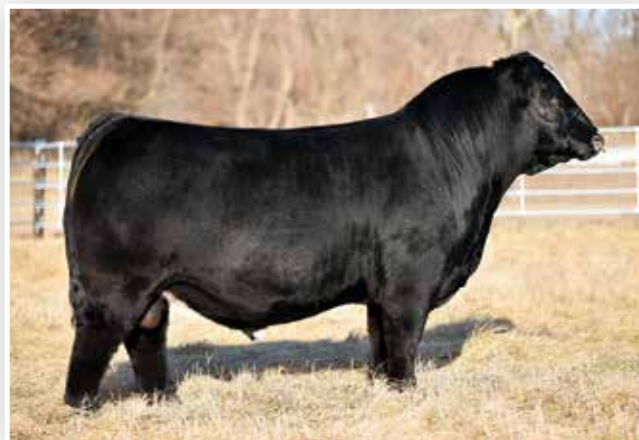
Lot 201A & 201B | JBSF BERWICK 41F

SO Remedy 7F is the exciting NEW homozygous black and homozygous polled outcross Purebred Simmental sire. Extreme look, presence, style, and feature. A truly elite option to incorporate into your next breeding decision.