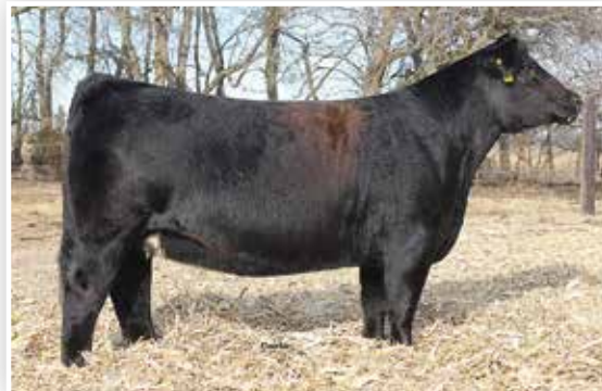
WAGR PANARAMA 204Z

Dam of the $400,000 Profit and Full Sister to Dam of Lot 8