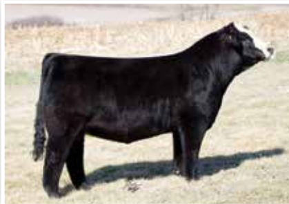
Profit Maker was the high selling member of the 2017 Reserve Grand Champion Pen at the NWSS! Owned by Rust Mountain View Ranch