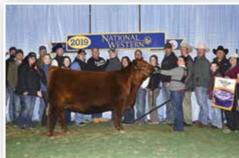
DAMAR BARCELONA E067 | Paternal Sister to Lot 27 2019 NWSS Grand Champion Heifer

ANDRAS IN FOCUS B175 ANDRAS FUSION R236 ANDRAS BELLE B167 FEDDES SHOOTER A76-D243 SRA REDEMPTION 8667 TBS SENSATION 667