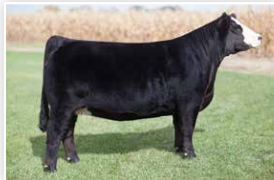
TKCC DOLLY 49C | Dam of Lot 7

REMINGTONSECRETWEAPON185 DMCC COUNTER ATTACK 8C CARD FOREVER 61A GLS NEW DIRECTION X184 TKCC DOLLY 49C FORD RJ DOLLY Y83