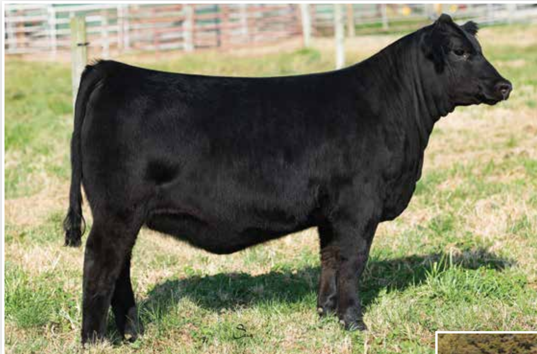
Lot 15 HARKERS ZOEY H150

Harkers Zoey H150 is sired by GCC Money Earned, a member of the 2019 Griswold Cattle Company Denver pen. It's easy to see that Money Earned has become one of the most well-versed sons of the legendary Dameron First Class. The dam of H150 is the famed Double R She's The One K18 matron, making her a maternal sister to the prolific Rhythm 418P matron that has been the foundation of the respected Ruby Cattle Company program of Iowa. H150 is elite in her feature, neat chested, bold ribbed, and sets down to the surface with extreme accuracy and comfort. A unique SimAngus pedigree that combines the influence of First Class and K18... she is truly bred in the purple!