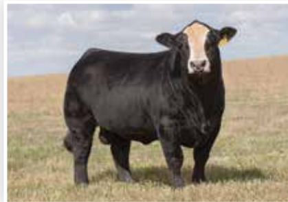
Dagger is sired by Profit and backed by the $114,000 Crysteel. Owned by Double Bar D Farms