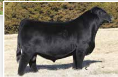
GCC MONEY EARNED | Sire of Lot 15

Harkers Zoey H150 is sired by GCC Money Earned, a member of the 2019 Griswold Cattle Company Denver pen. It's easy to see that Money Earned has become one of the most well-versed sons of the legendary Dameron First Class. The dam of H150 is the famed Double R She's The One K18 matron, making her a maternal sister to the prolific Rhythm 418P matron that has been the foundation of the respected Ruby Cattle Company program of Iowa. H150 is elite in her feature, neat chested, bold ribbed, and sets down to the surface with extreme accuracy and comfort. A unique SimAngus pedigree that combines the influence of First Class and K18... she is truly bred in the purple!