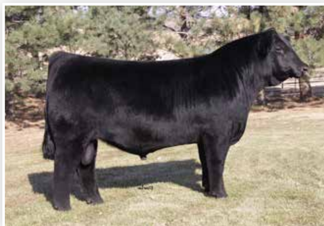
Lot 207 | SS/PRS HIGH VOLTAGE 244X

Ruby's Currency 7134E is the outcross herd sire that is owned by Freking. He commanded a record setting $435,000 in 2018 and continues to make an impact on the breed. A son sold in 2020 for $350,000 to Dotted K Genetics of Texas.