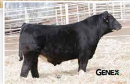
TJ FROSTY 318E | Sire of Lot 28

We initiate the bred female division with a true powerhouse and sale feature half-blood SimGenetic female that is sired by the 2017 Triangle J Ranch high selling bull, TJ Frosty 318E. JDA Ms Frosty G710 is backed by a powerful daughter of Leachman Cadillac L025A. She has been applauded for her stoutness, shape, and genuine build. She is big footed, stout boned, and wide pinned. In addition to her standout phenotype, G710 offers breed leading figures. She ranks top 15% BW, top 10% WW, top 15% YW, top 10% Milk, top 4% MWW, top 5% Doc, and top 20% TI. She was successfully campaigned on several occasions by Chloe Rains, including being selected as the Reserve Supreme Female at the Saline County Fair and Expo. A foundation female that has extreme mating flexibility! AI BRED 4/5/20 TO THSF LOVER BOY B33 (ASA: 2983443) Offering 1/2 Interest. For more information please contact Cory Rains at (402) 826-1270 to discuss details.