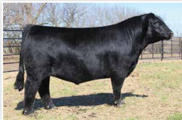
SWSN CASH FLOW 81E | Sire of Lot 31 & 32

Bold, stout, and attractive... the quickest ways to describe the presence and look that Miss 912G offers. She is sired by the $250,000 SWSN Cash Flow 81E and backed by a productive Angus dam in the Simons program. She is safe in calf to the elite calving ease specialist, Thor, a direct son of the $200,000 Hammer and $114,000 Crysteel Tango. A royal pedigree that is sure to enhance any programs bottom line. AI BRED 6/17/20 TO THOR 503C (ASA: 3009490)