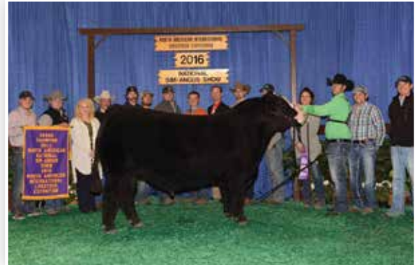
KRMS PRIMARY CANDIDATE | Sire of Lot 38

VCL 382G is a stout boned, long fronted, feminine Purebred daughter of the multiple-time National Champion, LLSF Pays To Believe ZU194 and backed by the great Foxy Lady 1B matron in the Vogler program at Ashland, Nebraska. Foxy Lady 1B has produced several high selling females and sons that are now employed in top programs across the country. She is safe in calf to the breed's newest sensation, SO Remedy 7F. . . the ROI is all inclusive here! AI BRED 4/27/20 TO SO REMEDY 7F (ASA: 3419044). SAFE AI