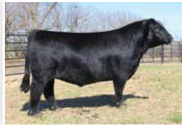
SWSN CASH FLOW 81E Sire of Lots 1 & 2

Miss Pandora 085H is a powerful March show heifer prospect that is sired by the $250,000 SWSN Cash Flow 81E, an own son of the $100,000 Lady Di. Lady Di is backed by the $114,000 BF Miss Crysteel Tango, now owned by Kersten Cattle Company. 085H is a sharp featured, sleek fronted, clean chested, and has the appropriate progression of depth back through her rear rib and flank. She is supported by the influence of the great Foxy Lady 1B. Power in the blood!