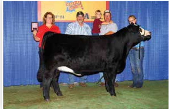
HSC ARIA 001A | Dam of Lot 13

LKCC Aria 910H is sired by the $200,000 MR TR Hammer 308A ET and backed by the cornerstone female of the Kersten program, HSC Aria 001A. A full sister to 910H topped The Event Vol. I to Diamond A Farms of Altamont, Illinois at $15,000. Aria is a direct daughter of the late Pilgrim and from the Limestone Vale Bar W966 matriarch. 910H is stout, extended, and offers tremendous shape. A brood cow in the making.