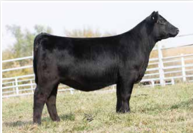
SB BLACKBIRD 723 Donor for Kearns Cattle Company from the 1119 cow family!