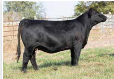
Lot 34C LKCC MISS GENESIS 81G

AI BRED 4/5/20 TO PERFECT VISION 26D (ASA: 3251627). PE 6/2/20-8/24/20 TO LKCC WHO KNEW 433F (ASA: 3779903).