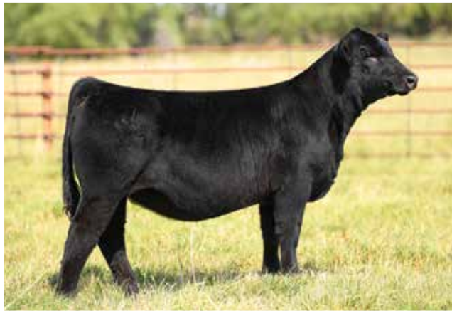
KCC1 SWC HARMONY 847H | $60,000 heifer sired by Right Time