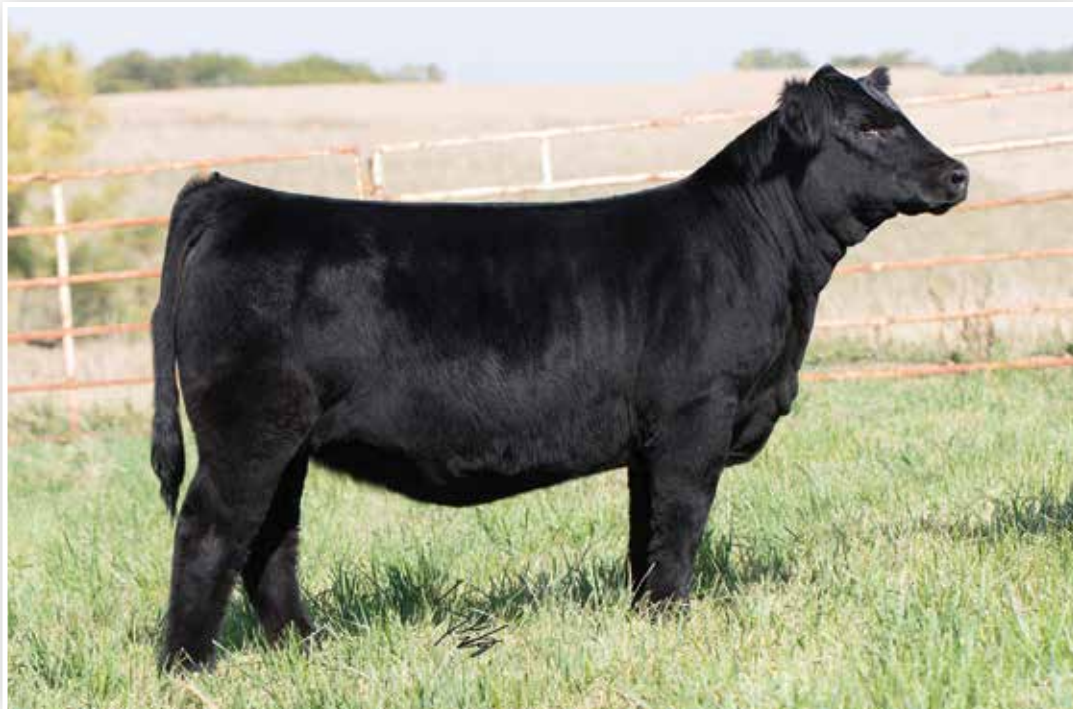
Lot 1 | CACHET 80H

Cachet 80H is a leading daughter of the $250,000 SWSN Cash Flow 81E that has taken the breed by storm. The dam of 80H is a past high selling female from The Event that was purchased by the Staab family of Ord, Nebraska. The influence of Foxy Lady 1B can be identified throughout the Vogler program and is recognized for the extreme consistency and quality that she transmits to her progeny. 80H is striking in her presence and offers a futuristic look that you can hang your hat on. Bid with confidence!