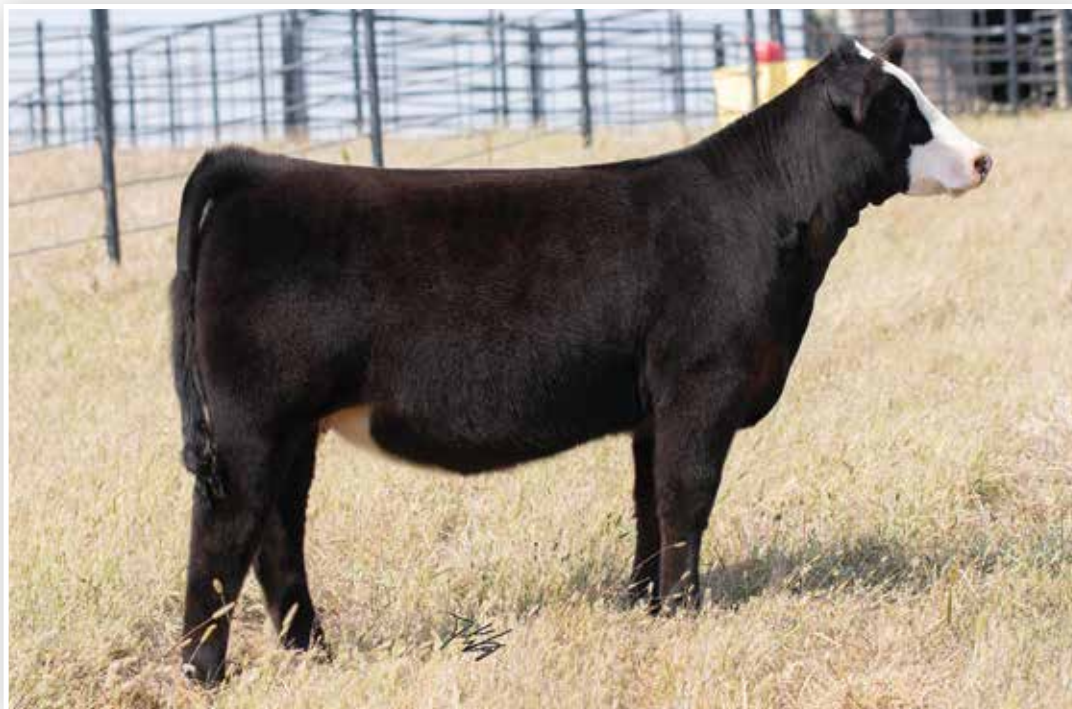
Lot 16 | BT JUST A DREAM H1

BT Just A Dream H1 is a stunning blaze faced half-blood SimAngus female that is sired by the industry leading W/C Loaded Up 1119Y. The dam of this sharp featured April born female is sired by the great GCC Osage 601S. H1 is angular about her front third, neat chested, big ribbed, stout hipped and sound on her feet and legs. An ultra-competitive late spring SimAngus female that is backed by a productive Angus dam.