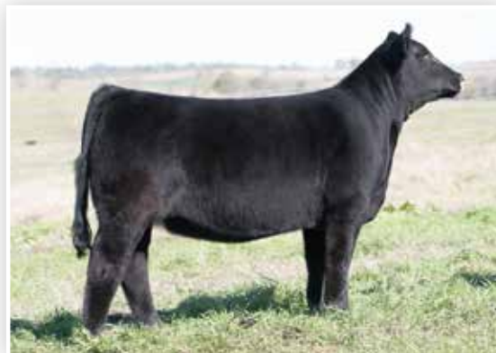
VCL FARRAH 803F | Dam of Lot 1