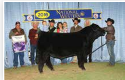
THSF LOVER BOY B33

Service Sire to many of the bred females selling!