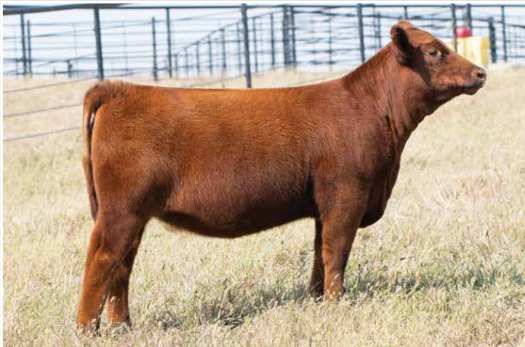
Lot 27 | SRA RED FUSION KYLA 0866

SRA Red Fusion Kyla 0866 is the lone Red Angus female within the offering, but her phenotype and natural presence certainly warrant attention. Sired by the tried and true, Andras Fusion R236, and backed by a Feddes Shooter bred dam. Fusion is the sire of the 2019 NWSS Grand Champion Bull and Female and continues to be used extensively across all segments of the industry. 0866 is sleek fronted, big footed, stout boned, square hipped, and sets down with accuracy of stride. She is soft haired as an added bonus, with the show ring presence and style necessary to be noticed. A unique sale feature and first time offering from The Event group!