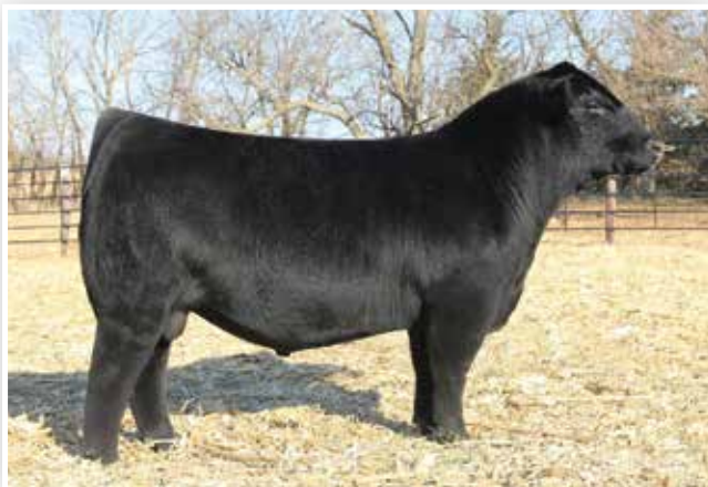
Lot 200A & 200B | SO REMEDY 7F

SO Remedy 7F is the exciting NEW homozygous black and homozygous polled outcross Purebred Simmental sire. Extreme look, presence, style, and feature. A truly elite option to incorporate into your next breeding decision.