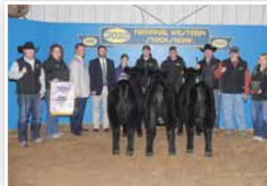
2020 NWSS RESERVE GRAND CHAMPION PEN OF THREE

AI BRED 4/9/20 TO C BAR PAY OFF 108Y (ASA: 2595936). PE 6/2/20-8/24/20 TO LKCC WHO KNEW 433F (ASA: 3779903).