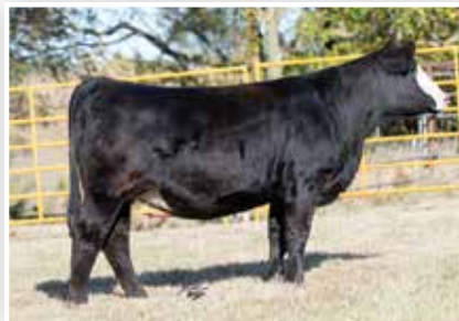
Lot 40 RAINS IRON JUDGE 282

AI BRED 4/6/20 TO THSF LOVER BOY B33 (ASA: 2983443)