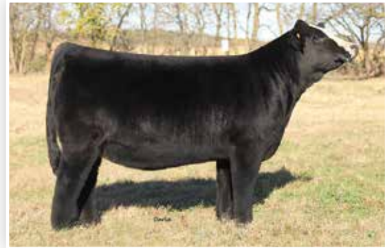
LADY DI | $100,000 Full Sister to Dam of Lot 5

VCL Lady Di's Viper 19H is sired by LHT Viper 65E, a powerful son of the great W/C Loaded Up 1119Y and backed by the famed Black Star cow family that has reserved a place in the history books of the Simmental breed. Presence, power, and style are all inclusive in this powerhouse March born Purebred. The dam of 19H is a full sister to the $100,000 Lady Di, the Vision sired daughter of the $114,000 BF Miss Crysteel Tango. Backed by a pedigree lined by elite matriarchs.