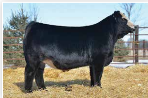
SWSN PHENOM | Sire of Lot 22

Freedom Broker 201H is a standout Percentage SimAngus female that is sired by the tried and true triple crown winning MR HOC Broker. Broker has experienced as much success at every level of competition than any other bull of any other breed over the last decade. The results paint the picture and we firmly believe that this blaze-faced female has the potential to be a major player next summer and throughout the fall and winter. The dam of 201H is a role model half-blood that is sired by the legendary Angus sire, TC Freedom 104.