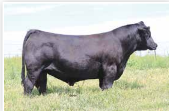
PERFECT VISION 26D | Sire of Lot 33

MR CCF VISION PERFECT VISION 26D HTP SVF DEW THE STROKE WAGR DRIVER 706T LKCC MISS DRIVER 5C 5A