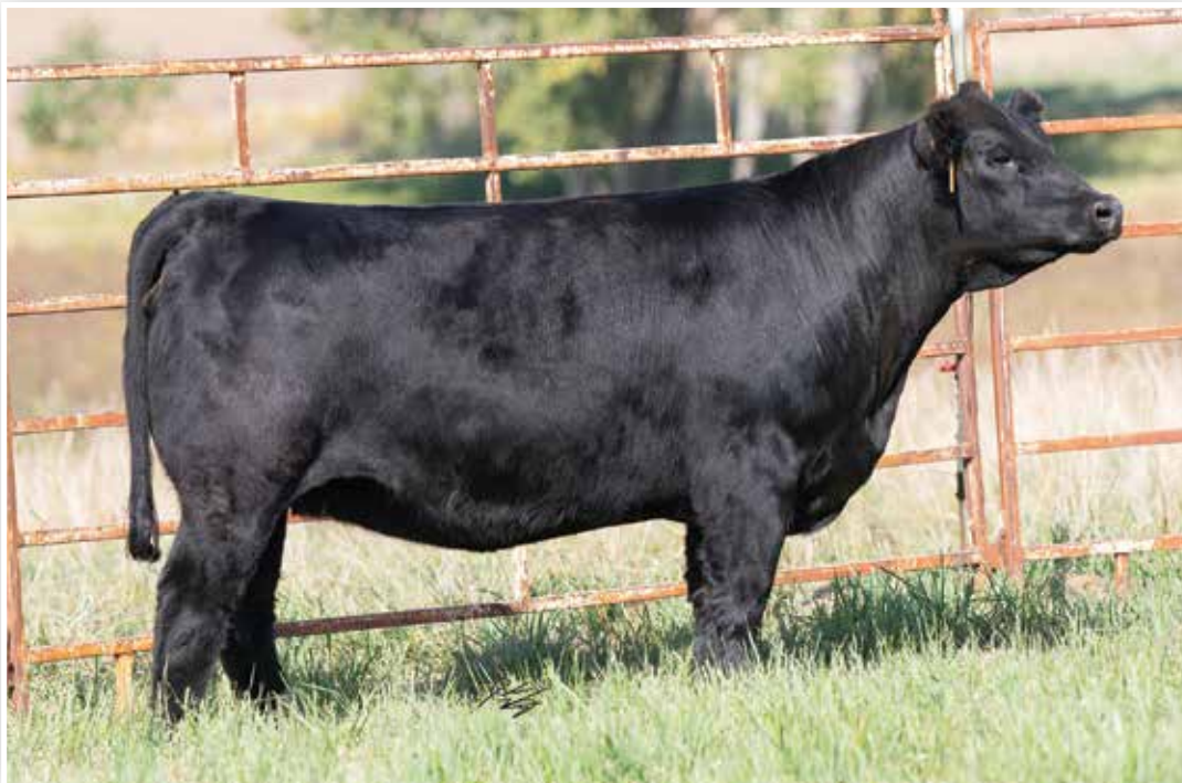
Lot 39 | VCL MISS FORTUNE 911G

VCL Miss Fortune 911G is sired by the $185,000 ACLL Fortune 393D, a direct son of the $200,000 Hammer and $100,000 Firefly. The dam of 911G is a powerful Driver half-blood cow with extreme udder quality and mass. 911G is a moderate framed, stout bodied, big hipped three-quarter blood that is safe in calf to Remedy... big time potential here! AI BRED 4/27/20 TO SO REMEDY 7F (ASA: 3419044). SAFE AI