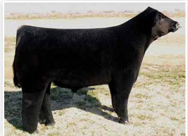
MONOPOLY | Sire of Lot 304 Embryos