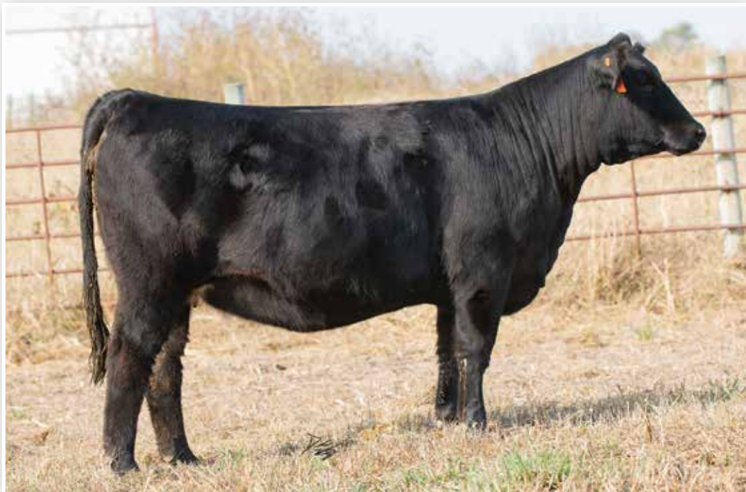
Lot 33 | LKCC MISS PERFECT 5G

LKCC Miss Perfect Vision 26D is sired by the full brother to the great MR CCF 20-20 and backed by a productive daughter of the great WAGR Driver 706T. This three-quarter blood female offers exceptional skeletal quality, look, and presence. A high-quality female that was AI bred to the $400,000 High Caliber... pay attention here! AI BRED 4/8/20 TO TJ HIGH CALIBER 556B (ASA: 2891465). PE 6/2/20-8/24/20 TO LKCC WHO KNEW 433F (ASA: 3779903).