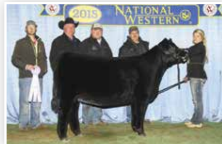
FSC1 ERICAS REGARD B429 | Dam of Lot 29

REMINGTONSECRETWEAPON185 DMCC COUNTER ATTACK 8C CARD FOREVER 61A YARDLEY HIGH REGARD W242 FSC1 ERICAS REGARD B429 FSC ERICAS LUTTON