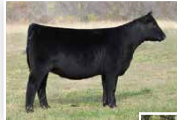
SB BLACKBIRD 517 Donor for Bird Cattle Company from the 1119 cow family!

SB Blackbird 003 is an exciting January show heifer prospect that is sired by Musgrave Big Sky. The dam of this sharp featured Angus heifer calf is sired by EXAR Upshot 0562B. She offers a balanced number profile to accompany her striking look of balance and quality. A top show heifer prospect that we anticipate making a role model brood cow once she enters production.