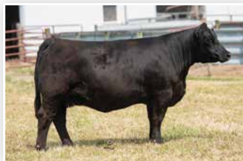
HARKERS DINAH MITE D133 | Dam of Lot 9