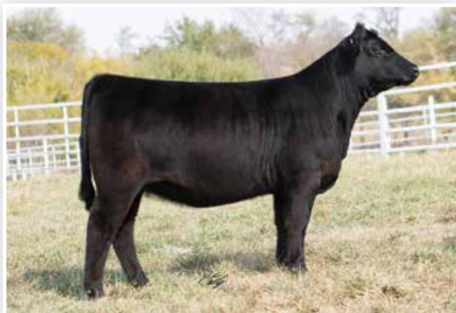
MR SB LZ F ELY 147E Sire of Lot 24