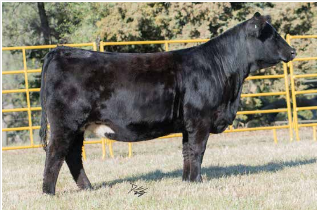
Lot 30 | RAINS COUTNER EDITON G107

Rains Counter Edition G107 is another stout featured, big footed, good looking daughter of Counter Attack. The dam of G107 is a foundation female in the Rains Simmental program that has made a lasting impression, recording several high sellers and individuals of influence. Progeny of Rains Dream Edition 117 can be found working in top programs across the country. G107 is ultra-complete in her type and kind, offering a bold and maternal rib cage that has facilitated her added fleshing ease and functionality. She sells safe in calf to the late Quantum Leap, a sire of impact that is no longer on the open market... help yourself! AI BRED 4/5/20 TO HPF QUANTUM LEAP Z952 (ASA: 2649657) ULTRASOUNDED SAFE AI WITH A HEIFER PREGANCY.