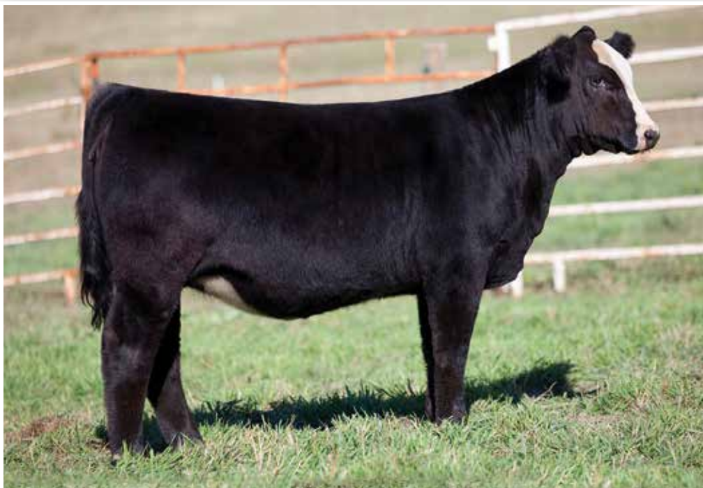
DIAMOND 676D | Full Sister of Lot 301 Embryos