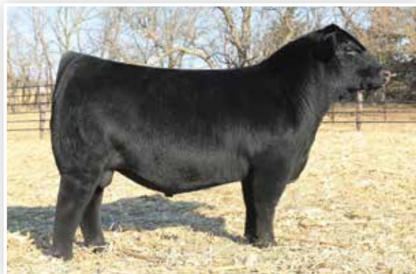
SO REMEDY 7F | Service Sire to many of the bred females selling!

VCL Miss Profit Maker 953G is a standout daughter of the great VCL LKC Profit Maker 604D that is employed at Rust Mountain View Ranch and backed by a powerful half-blood daughter by the triple crown winning MR HOC Broker. She is a stunning blaze faced female that is safe in calf to the six-figure valued SO Remedy 7F, the new and exciting homozygous black and homozygous polled Purebred sire at Hartman Cattle Company. The resulting progeny from this mating will be Purebred. Herd building opportunity on November 28, 2020 in Pleasant Dale, Nebraska! AI BRED 4/27/20 TO SO REMEDY 7F (ASA: 3419044). SAFE AI