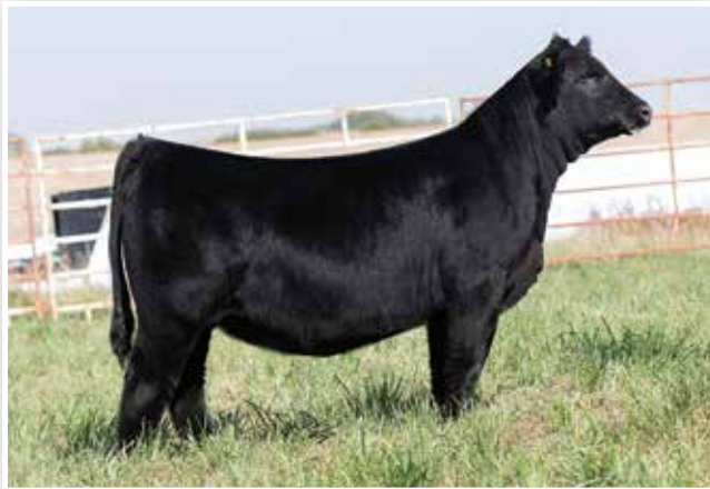
VCL FORESIGHT Sire of Lot 3