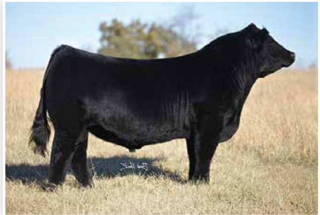
LLSF PAYS TO BELIEVE ZU194 | Sire of Lot 303 Embryos