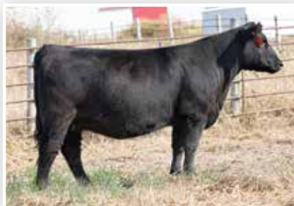
Lot 42 KERSTEN 113G

AI BRED 4/9/20 TO K BAR D JOE DIRT 20C (AAA: 17856509). PE 6/2/20-7/6/20 TO LKCC WHO KNEW 433F (ASA: 3779903).