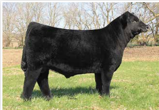
Lot 203A & 203B | TL LEDGER

W/C Fort Knox 609F topped the 2019 Werning Cattle Company bull sale commanding $180,000 to a progressive group of breeders from across North America. Fort Knox is an extremely unique three-quarter blood SimAngus bull with breed enhancing qualities. Pay attention here!