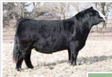
VCL LKC EQUITY 608D Sire of Lot 23

BT Black Velvet H11 is sired by the $70,000 VCL LKC Equity 608D. The dam of H11 is an extremely productive, bold ribbed, stout featured daughter of the show ring sire of the early 2000's, Plainview Lutton E102, affectionately known as "Lut". This star headed three-quarter blood is stout boned, big ribbed, and has the functionality of build to become a positive attribute to any operation.