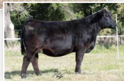
RAINS BRILLIANT LOAD F98 | Dam of Lot 20

Rains Profit Load H98 is sired by the Rust Mountain View Ranch resident herd sire, Profit Maker, the standout son of the $400,000 Profit that is backed by the $114,000 Crysteel Tango. A true showstopper that boasts a balanced look from the side. She is a beautiful blaze faced heifer that has been blessed with premium hair quality and offers a disposition suitable for a first-year showman. She is built for the backdrop!