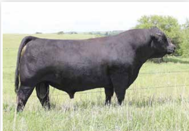
Lot 204 | WS PILGRIM H182U

WS Pilgrim H182U is now deceased. Limit semen is available, and it becomes more difficult to locate with each passing season. Pilgrim is the sire of the $400,000 Profit. There is no doubt he has left a BIG impact on the business.