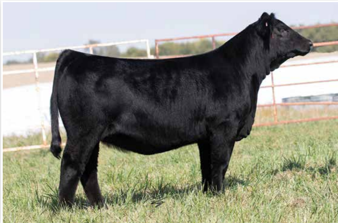
Lot 8 | VCL SELENA 9H

VCL Selena 9H is sired by the $18,000 VCL Foresight and backed by a full sister to WAGR Panarama 204Z, the dam of the $400,000 Profit. WAGR Brittany 205Z is a stunning female and cornerstone female within the Vogler program. The influence of the great 3C Melody M668 BZ will be everlasting within the business. A sleek made, extended, ultra-attractive female that is built to find success on the tan bark.