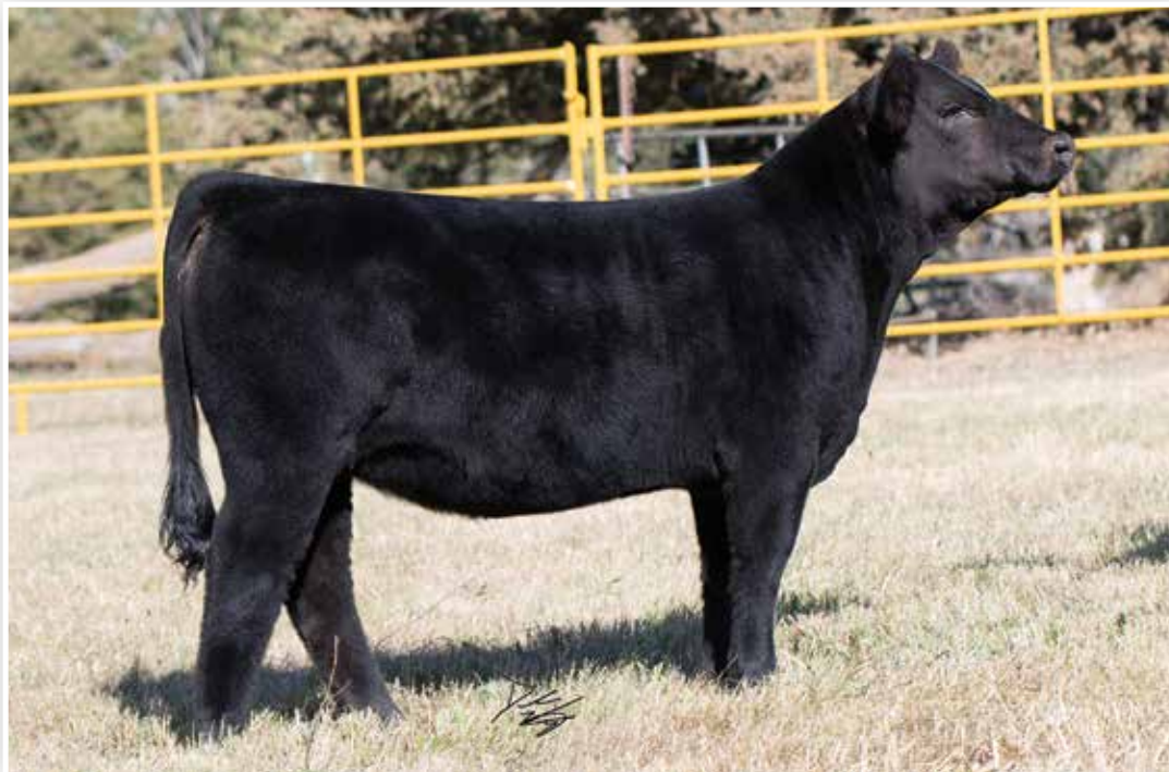
Lot 7 | RAINS DOLLY H24

Rains Dolly H24 is sired by the popular DMCC Counter Attack 8C and backed by a previous sale feature from the Kearns program that was selected by Rains Simmentals. H24 is backed by the legendary Ford RJ Dolly Y83 matron that has generated in excess of a million dollars in progeny sales during her lifetime. A powerful, shapely, ultra-attractive March born Purebred that is from one of the true elite cow lines within the industry.