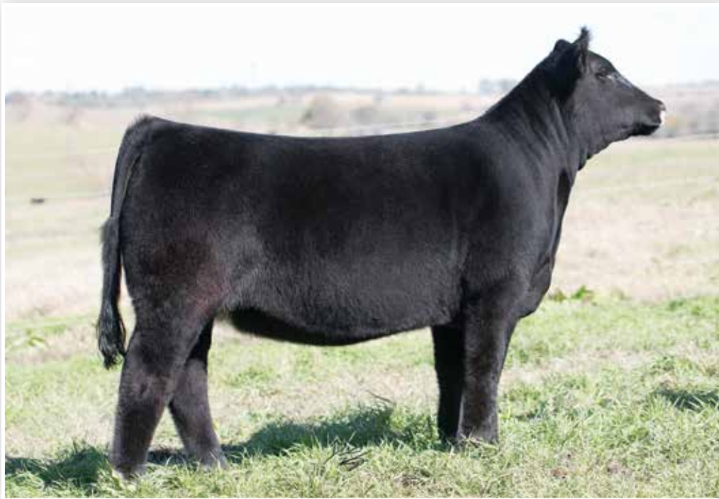
VCL FARRAH 803F $18,000 Maternal sister to Lot 302, 303, and 304 Embryos