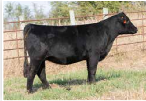
Lot 34A LKCC MISS GENESIS 422G

WS PILGRIM H182U PROFIT WAGR PANARAMA 204Z SS/PRS HIGH VOLTAGE 244X MISS A295 295Y