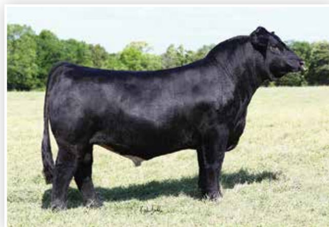
TNGL OBR FORTUNE 500C | Sire of Lot 300 Embryos

TNGL GRAND FORTUNE Z467 TNGL OBR FORTUNE 500C TNGL AWE STRUCK Y417 SVF STEEL FORCE S701 BF MISS CRYPEL TANGO LLSFTANGO T194