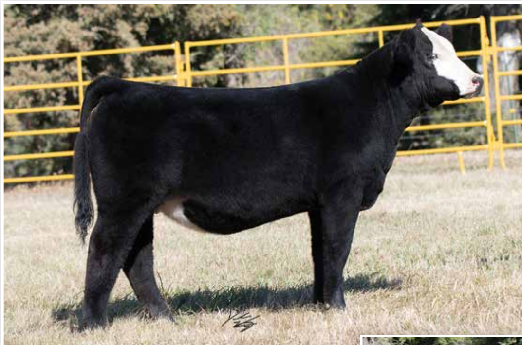
Lot 20 | RAINS PROFIT LOAD H98

Rains Profit Load H98 is sired by the Rust Mountain View Ranch resident herd sire, Profit Maker, the standout son of the $400,000 Profit that is backed by the $114,000 Crysteel Tango. A true showstopper that boasts a balanced look from the side. She is a beautiful blaze faced heifer that has been blessed with premium hair quality and offers a disposition suitable for a first-year showman. She is built for the backdrop!