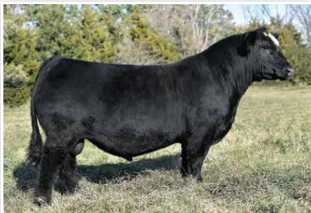
Lot 202A & 202B | W/C FORT KNOX 609F

W/C Fort Knox 609F topped the 2019 Werning Cattle Company bull sale commanding $180,000 to a progressive group of breeders from across North America. Fort Knox is an extremely unique three-quarter blood SimAngus bull with breed enhancing qualities. Pay attention here!