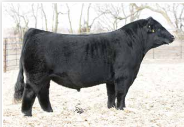
Lot 205 | ACLL FORTUNE 393D

WS Pilgrim H182U is now deceased. Limit semen is available, and it becomes more difficult to locate with each passing season. Pilgrim is the sire of the $400,000 Profit. There is no doubt he has left a BIG impact on the business.