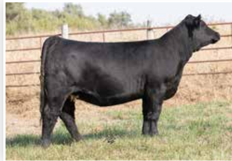
Lot 34B LKCC MISS GENESIS 72G

AI BRED 4/8/20 TO PERFECT VISION 26D (ASA: 3251627). PE 6/2/20-8/24/20 TO LKCC WHO KNEW 433F (ASA: 3779903).