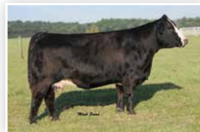
DOUBLE R SHESTHEONE K18 Famous Maternal Granddam of Lot 15