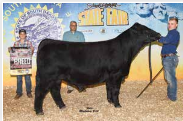
GTWY-REFORM F165 | SD State Fair Grand Champion Simmental Sire of Lot 18

Rains Reform H213 is a stout featured three-quarter blood female that is sired by the Rains Simmentals resident herd sire, GTWY Reform F165. Reform is a past high seller from the Gateway Genetics bull sale. H213 is ultra-attractive about her front third, big boned, and backed by an elite cow family that traces to the S316 matriarch.