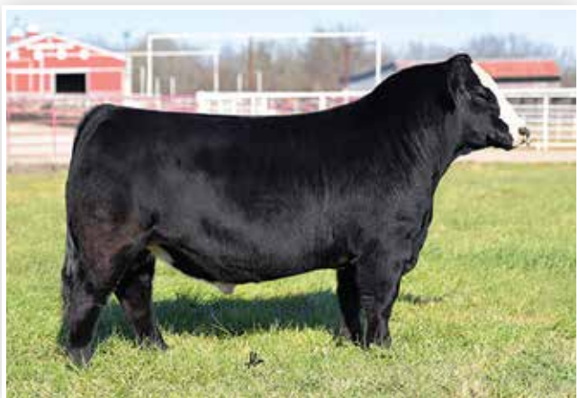
Lot 208 | HILB ORACLE C033R

Oracle is a proven sire of major show winners, including the 2018 NAILE and 2019 National Western Grand Champion Simmental Bull. He consistently stamps cattle with extra extension and body in a flawless design profile that captivates judges. Oracle is Purebred, Homozygous Black, Homozygous Polled. Oracle sold for $52,000 in October of 2020 in the Badger Creek Ranch Dispersal Sale.