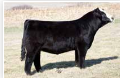
VCL LKC PROFIT MAKER 604D | Sire of Lot 20

PROFIT VCL LKC PROFIT MAKER 604D BF MISS CRYSTEEL TANGO W/C LOCK N LOAD 1143Y RAINS BRILLIANT LOAD F98 RAINS BRILLIANT WIND