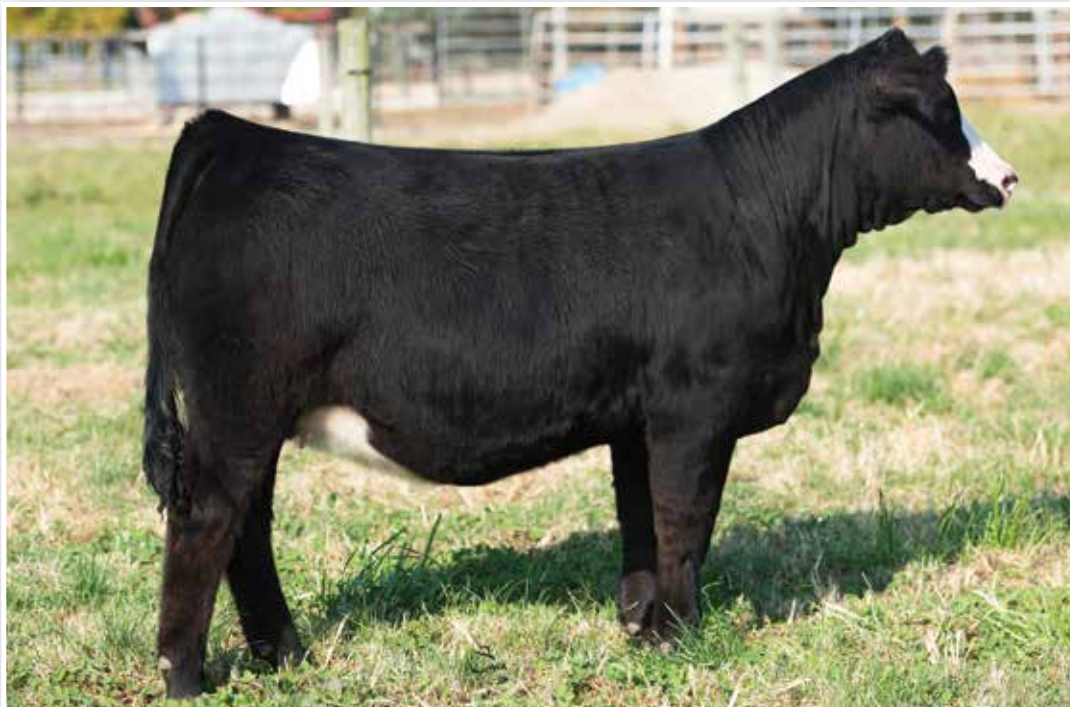
Lot 9 | HARKERS HEAVEN SENT H112

Harkers Heaven Sent H112 is a true sale feature among a deep offering of Purebred Simmental females to sell on November 28, 2020 in Pleasant Dale, Nebraska. This sharp featured baldy female is massive through her mid rib, deep sided, soft flanked, and sets to the surface with confidence. She is sired by the $240,000 GEFF County O Simmental bull that has left a lasting impression on the industry. The dam of H112 is sired by LLSF Uprising Z925 and traces to the foundation females of the Hilbrands program, HILB Covergirl A9 and AJE Gabby R7. She boasts a balanced number profile to compliment her stunning phenotype. An ultra-competitive February prospect that will be a force at the end of a leather lead... bid with confidence!