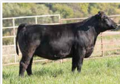
Lot 41 VCL MISS JUDGE 904G

AI BRED 4/27/20 TO SO REMEDY 7F (ASA: 3419044). SAFE AI