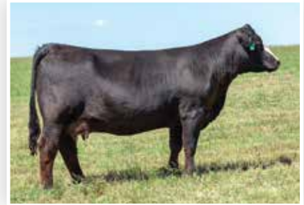
The High Selling Bred Female in the 2017 Event Sale Owned by Double Bar D Farms