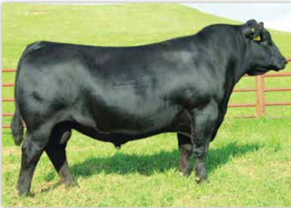
SAV Registry 2831 - Sire of Lot 14