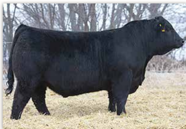
Rust Breakthrough 4043 - Sire of Lot 1