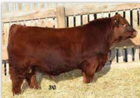
Red U-2 Renown 193C Sire of Lot 15