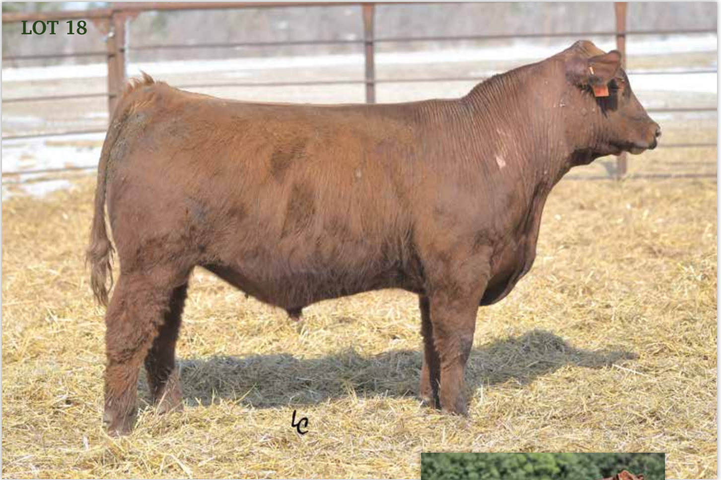
Red U2 Blue Collar 295E - Sire of Lot 19