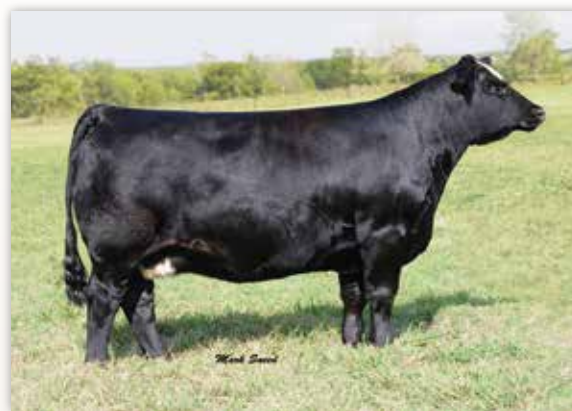
AJE/JF ANT Joys Elegance - Dam of Lot 1