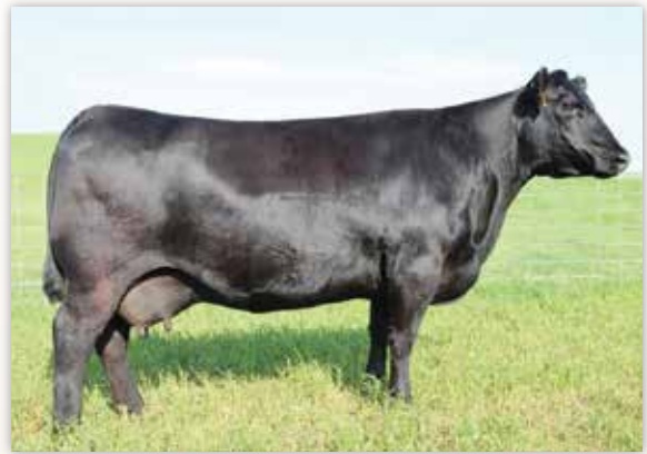
SAV Blackcap May 4136

$8.6 Million Dollar Producing Donor Dam and Full Sister to Dam of Lot 14