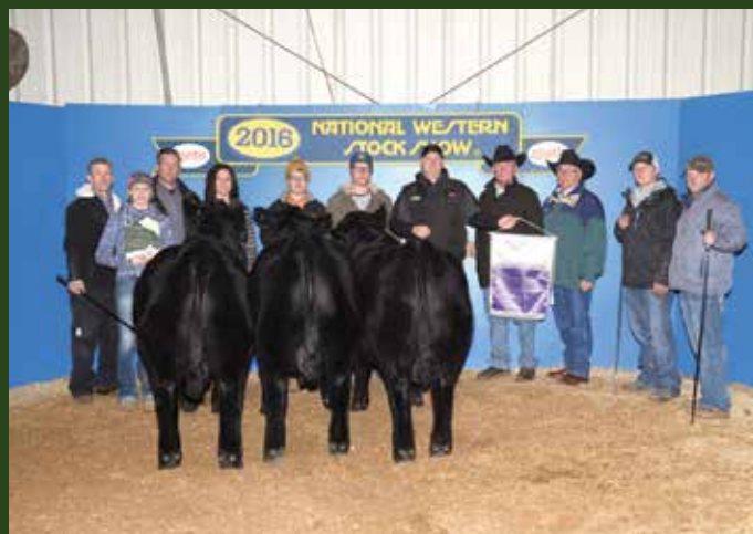
2016 NWSS Grand Champion Pen of Three Percentage Simmental Bulls