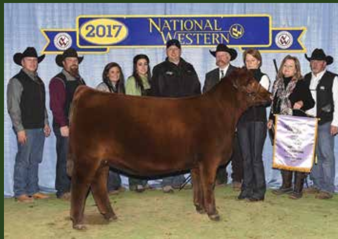
2017 NWSS Res. Grand Champion Red Angus Female