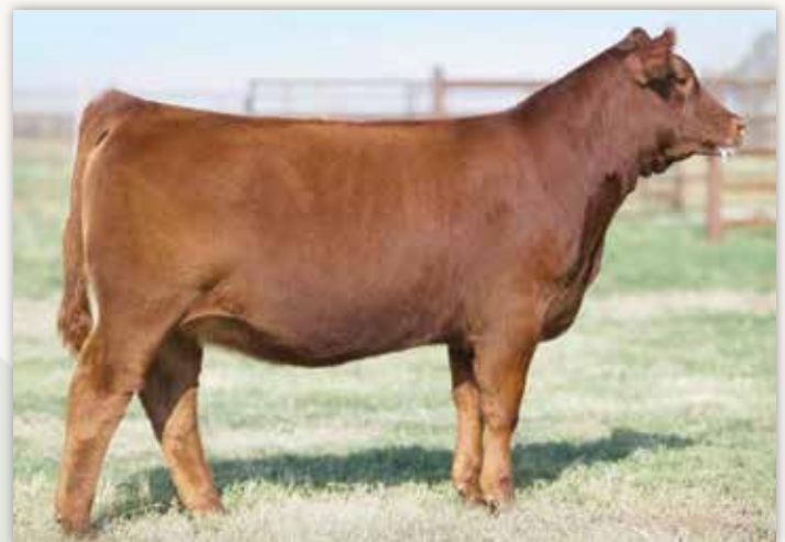
U2 Dolly Python 263B - Dam of Lots 16