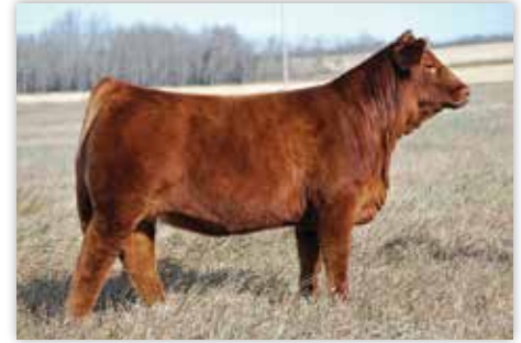
RF Flirt 728E Dam of Lot 7