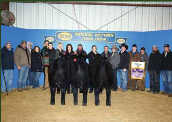
2019 NWSS Grand Champion Pen of Three Purebred Simmental Females