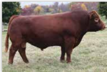
WBF Rest Easy U085 - Sire of Lot 6