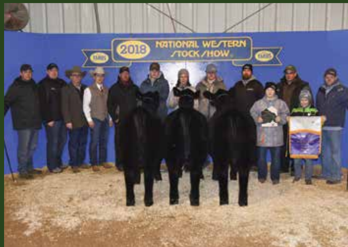
2018 NWSS Grand Champion Pen of Three Percentage Simmental Females