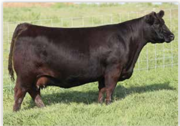
Soo Line Rose 1019 - Dam of Lots 9 - 11