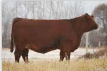
Beech Bros Yara 122Y - Dam of Lot 8