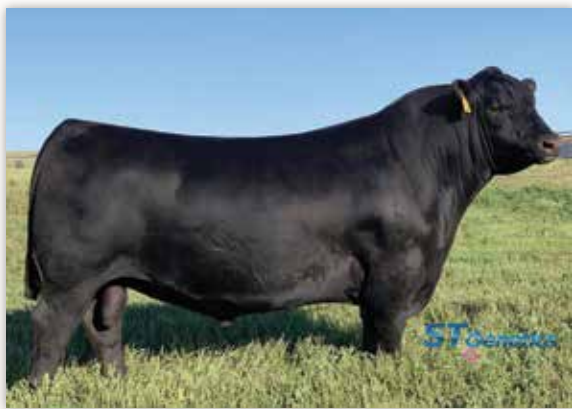
SAV Raindance 6848 - Sire of Lots 9 - 11