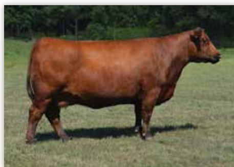
Bar-E-L Kassie 117X Maternal Granddam of Lot 15