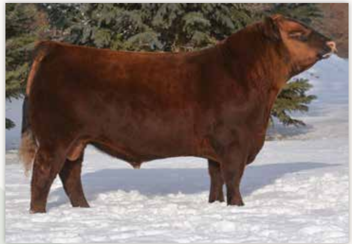
Damar Trump C512 - Sire of Lots 16 & 17