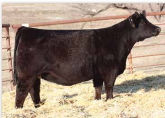
Harrell Angel 5870C - Dam of Lot 4