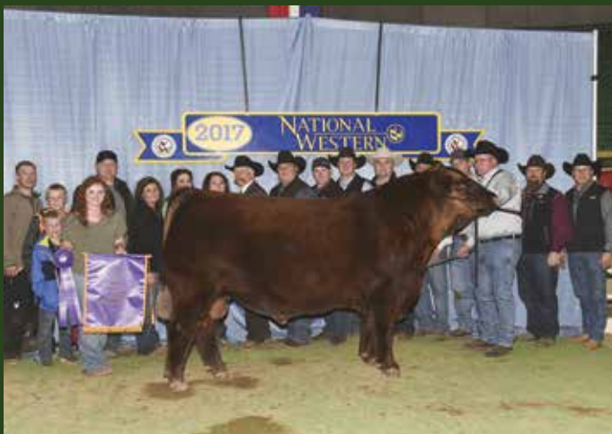
2017 NWSS Grand Champion Red Angus Bull