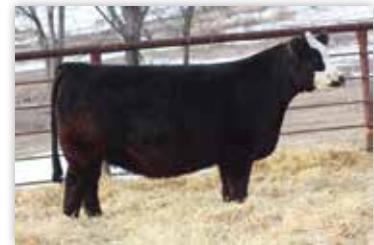
W/C Miss Werning 531C - Dam of Lot 5