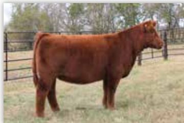
Bailey's Buck Cherry - Dam of Lot 6