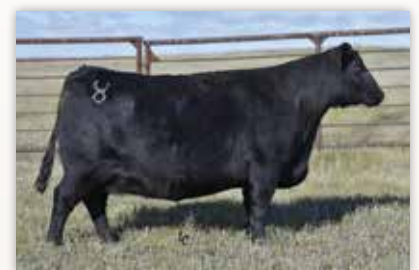
SAV Blackcap May 6566 Dam of Lots 12 & 13