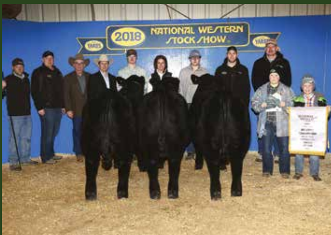
2018 NWSS Res. Grand Champion Pen of Three Percentage Simmental Bulls