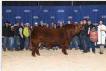
BGS/BM Captain Scream 63D - Sire of Lot 8