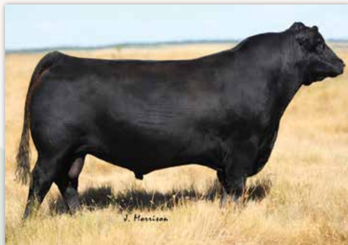
Soo Line Motive 9016 - Sire of Lot 2