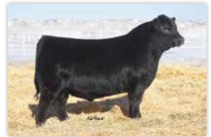
KR Casino 6243 Sire of Lots 12 & 13

Here is a stout and powerful pair of flush brothers that are sired by the two-time National Champion, KR Casino 6243. Casino is arguably one of the most impressive Angus bulls to surface in the last several years on the hill at the National Western Stock Show. Casino is backed by the late Malsons Savannah 27Y. The dam of 213G and 218G is the impressive SAV Blackcap May 6566, a full sister to the great 4136. SAV Blackcap May 4136 is the dam of the $750,000 President who has generated in excess of $8.6 Million and continues to produce promotion AI Sires. Sons of 4136 would include SAV Resource, SAV Renown, SAV Pedigree, SAV Sensation, SAV Seedstock, and the 2017 record-setting Charlo sons. These flush mate brothers by Casino are big footed, stout made, powerful individuals that offer phenotype, pedigree, and a true athletic build that will stand the test of time!