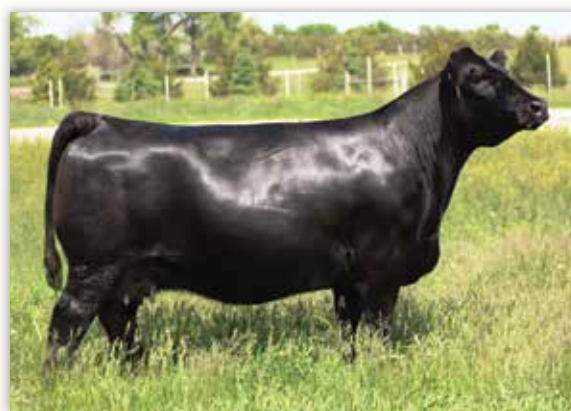
Miss Werning KP 8543U

Maternal Great Granddam of Lot 3 and legendary donor dam for Rust Mountain View Ranch. Watch for direct progeny to sell in future marketing events!