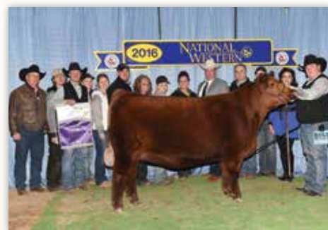
2016 NWSS Grand Champion Red Angus Maternal sister to dam of Lot 15