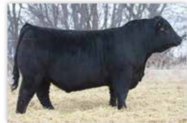
Rust Breakthrough 4043 - Sire of Lot 5