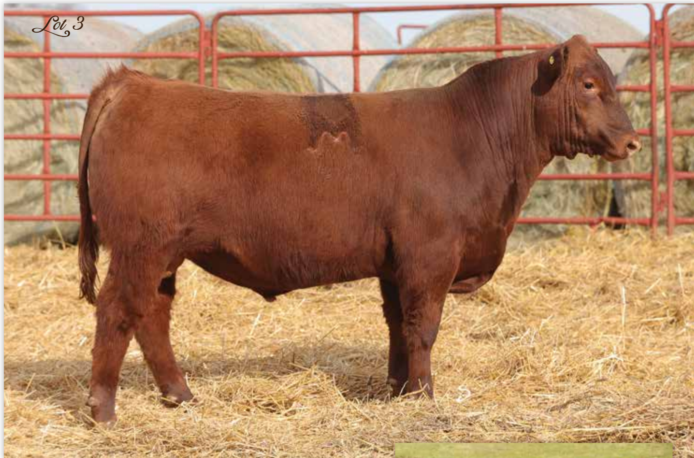
C-BAR ABIGRACE Y11 - PATERNAL GRANDDAM OF LOTS 1 - 17