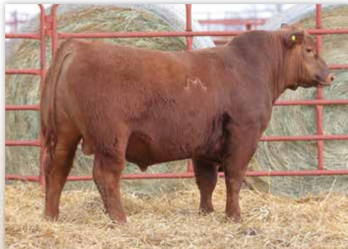
LOT 1 - 4MC FRANCHISE 931

931 boasts a WW Ratio of 114, and a REA Ratio of 110. He is among the top 1% GridMaster, top 3% WW, top 1% YW, top 1% ADG, top 17% Marb, top 17% YG, top 1% CW, and top 1% REA. 4MC Franchise 931 possesses plenty of carcass merit and still is a viable option to use on virgin heifers with his 78-pound birth weight.