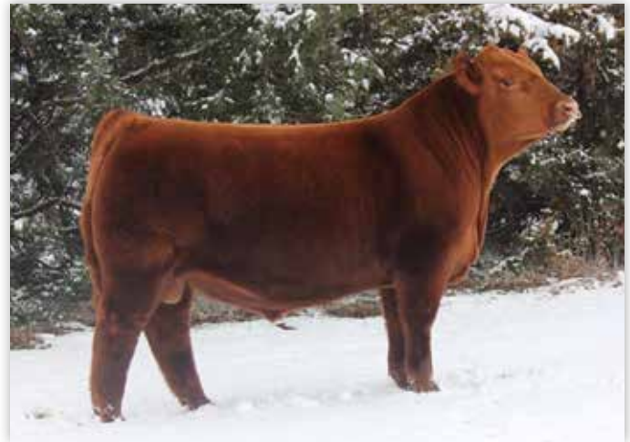
AHL FLASHBACK 446B - SIRE OF LOT 76 - 78

4MC Polly 9206 is sired by the six-figure valued AHL Flashback 446B and from the influence of a powerful Pieper bred dam. 9206 charts top 14% HerdBuilder, top 26% GridMaster, top 1% WW, top 3% YW, top 13% ADG, top 25% CEM, top 21% Stay, and top 15% Fat.