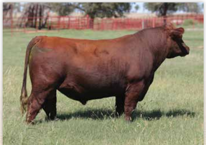
PIE NEW TERRITORY 523 - SIRE OF LOTS 18 - 36

9152 is another heifer bull prospect with a birth weight weighing in at 78-pounds. He boasts a WW Ratio of 120, YW Ratio of 105, and a BF Ratio of 118. This New Territory son charts top 10% GridMaster, top 1% WW, top 1% YW, top 1% ADG, top 1% CW, and top 16% REA. With over 750-pounds of weaning weight, rest assured he will add pay weight to your calf crop.