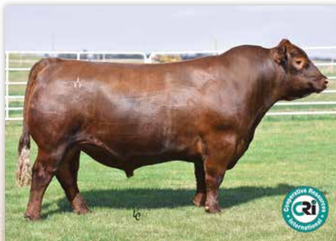
ANDRAS NEW DIRECTION R240 - PATERNAL GRANDSIRE OF LOTS 18 - 36

4MC New Territory 9163 offers a WW Ratio of 114, YW Ratio of 107, and an IMF Ratio of 111. With over 720-pounds of weaning weight, rest assured this pull will add pounds to your calf crop. He ranks top 29% HerdBuilder, 1% GridMaster, top 1% WW, top 1% YW, top 1% ADG, top 27% HPG, top 15% YG, top 3% CW, and top 5% REA.