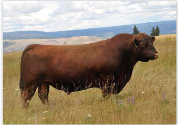
RREDS SENECA 731C - PATERNAL GRANDSIRE OF LOT 73 - 75

982 is from the 4MC Top Shelf 766 sire group. She is backed by the maternal influence of Red SVR Gangster 14S. 982 charts top 27% HerdBuilder, top 11% Milk, and top 2% Stay. A bold ribbed, easy keeping female with tremendous brood cow potential.