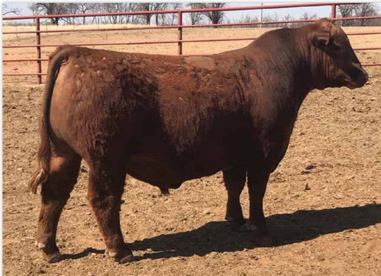
4MC KING OF THE COWBOYS 706 - SIRE OF LOTS 42 - 43

Here is a pair of stout made, big footed, wide based sons of our past high seller and popular 4MC King Of The Cowboys 706. KOTC progeny have been extremely popular around the country, with sons and daughters topping sales. In the fall of 2019, a daughter by KOTC topped the Red Angus division at Rust Mountain View Ranch, commanding $15,000! Look to the King Of The Cowboys progeny to add performance, look, and style!