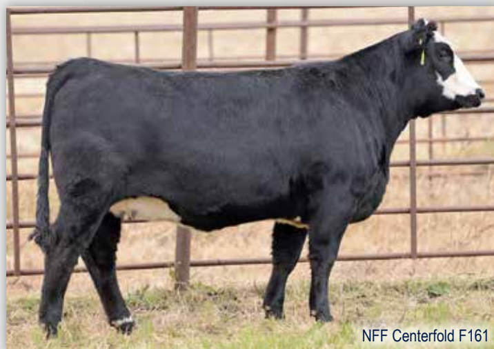
NFF Centerfold F161

Bred AI to GSC GCCO Dew North, ASA#3141837 on 4/12/19 Safe AI Ultrasound Info Bull calf estimated due 1/19/20