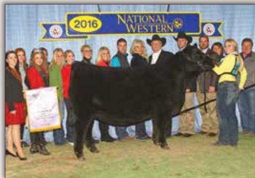
EXAR Frontier Gal 4865-2016 NWSS Reserve Grand Champion Angus Female. Full sister to dam of Lot 20.