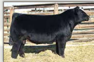
WLE Big Deal A617 - reference sire

The Big Deal sire group has been prevalent in our breeding program for nearly three years. We love the influence of Steel Force in our program and when you can add the famous 770P to the mix, it only gets better. Length, correctness of pattern, udder quality, and fertility come to the forefront.