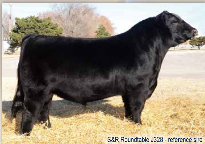
S&R Roundtable J328 - reference sire

PE to SS Great Northern H52, AAA#18300655 confirmed safe estimated due 3/2/20.