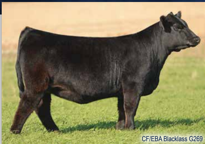
CF/EBA Blacklass G269