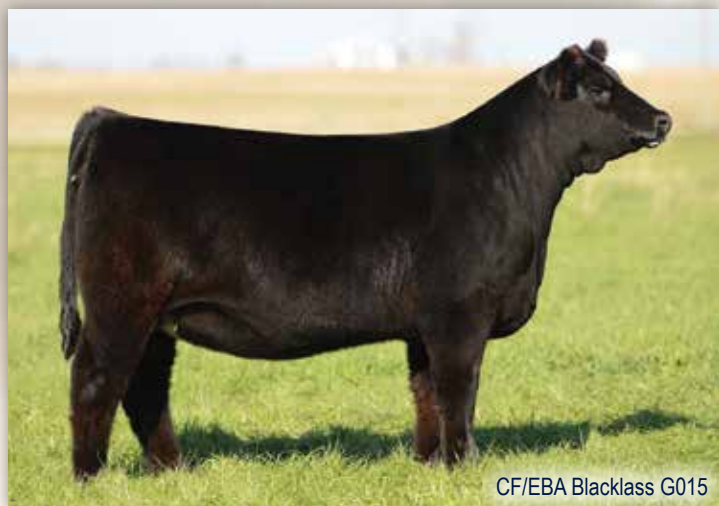
CF/EBA Blacklass G015

If this one doesn't stop you in your tracks with her captivating look, then we don't know what will! Sired by Relentless and backed by A24, this female offers a winning combination genetically that is sure to be an asset both at the end of the leather lead and in the pasture. Study her angles, the mass and turn to her center body, while still offering a lady like look from the profile. Her perfect baldy markings only add to her charisma.