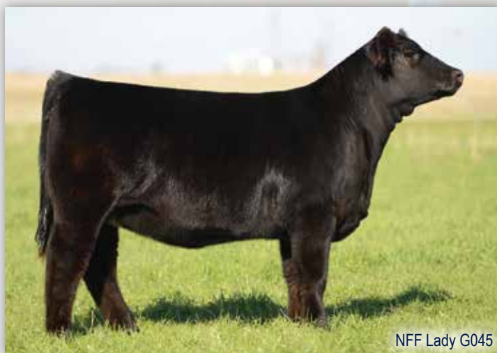
NFF Lady G045

Massive bodied, robust in her rib cage, and three-dimensional in shape. This female has the added bells and whistles to be a big-league donor when her time in the show barn comes to an end. Consistency is key and we are anxious to watch these females make an impact, just as their mother has done for our program.