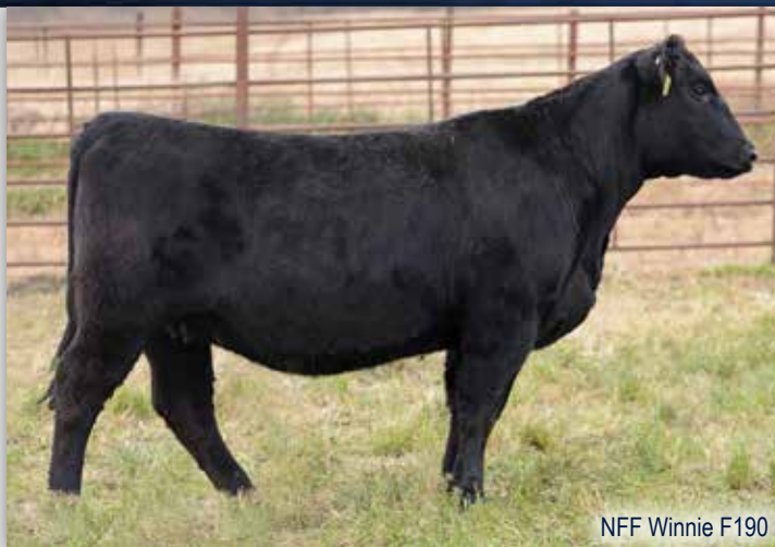
NFF Winnie F190

PE to SS Great Northern H52, AAA#18300655 confirmed safe estimated due 2/15/20.