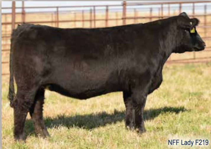
NFF Lady F219

ZKCC Easy Rider and Lo-Boy were our selections from Kraenow Cattle Co. They are the Pilgrim influenced sons of the full sister to the legend, ZKCC Chopper. The maternal power and balance of pedigree, curb appeal, and longevity are all inclusive in the stock sired by these two full brothers. The 824 donor dam has as much impact in the entire offering as any one cow and when you line it up, it's our opinion that it only gets better. The maternal granddam of this offering of bred cattle is one that was admired by many in her early years and brought the Kraenow program to the forefront. They won't have the indicators in their favor on paper, but they will have the look and style that everyone runs to Stillwater for.