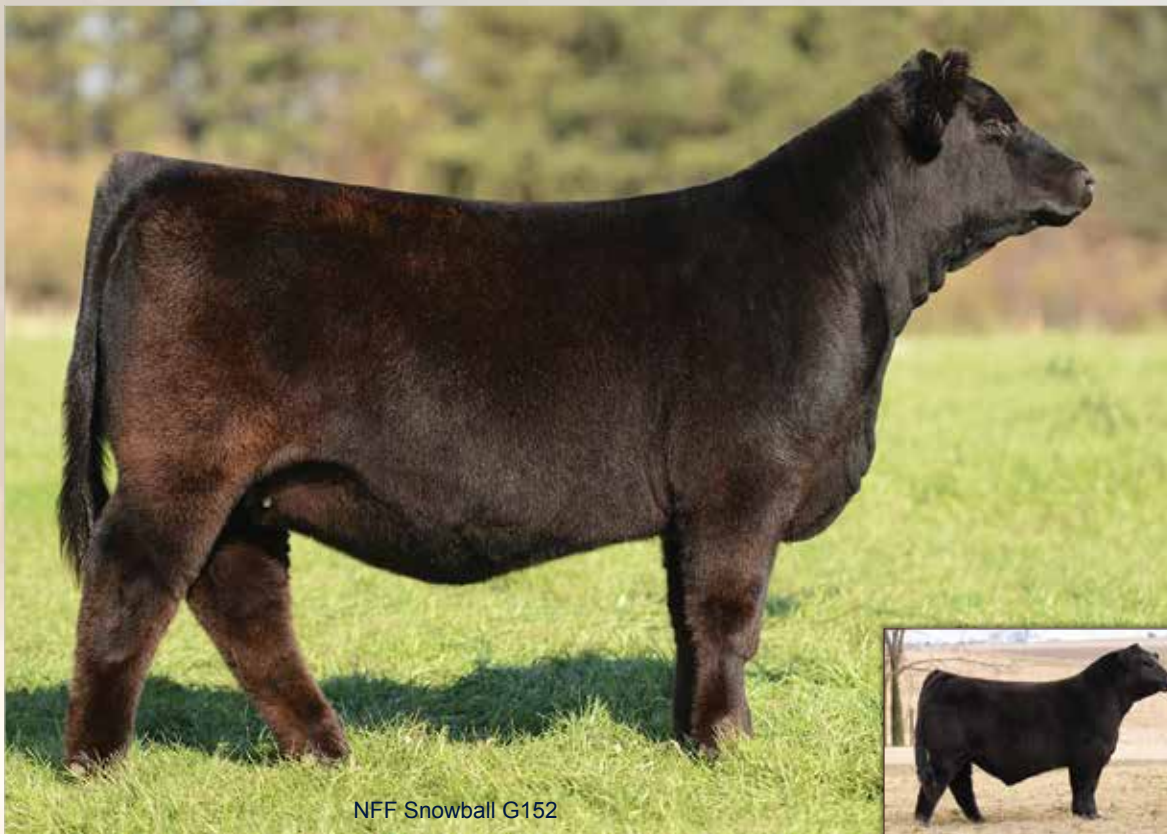
NFF Snowball G152