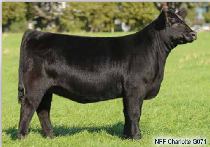
NFF Charlotte G071