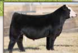
JASS On The Mark 69D - ref. sire