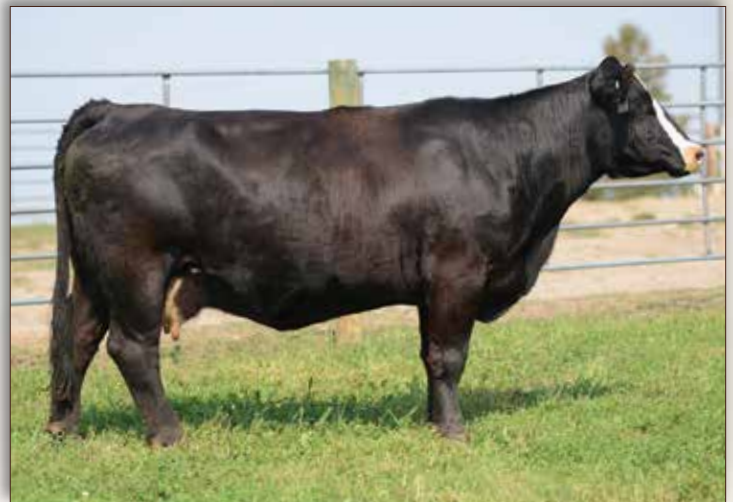
NFF Snowball Y062 - reference dam

Sleek made, attractive, and futuristic in her basic build. These are just a few of the ways we like to describe one of the most unique Purebred females in the entire offering. Red hided cattle of this quality are tough to create, and when the stars align and the perfect blaze face comes as an added bonus, the excitement is difficult to contain. NFF Snowball Y062 is the donor dam to this March show heifer prospect and is without question the foundation of our program. Be sure to have this red head on your short list sale day in Decorah!