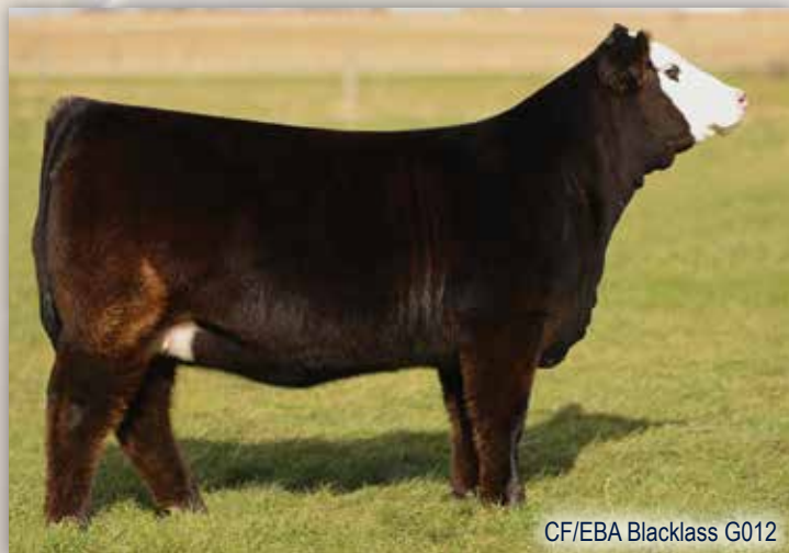
CF/EBA Blacklass G012

Relentless has solidified his spot in the business as "King of the Ring", and there is no arguing with results! Time after time we see Relentless progeny dominant their class, division, and show regardless of the stage or level of competition. Here is a big centered, good bodied, easy fleshing Relentless from the A24 matron that has contributed as much as any donor cow on the place to this sale offering. A top percentage show heifer prospect that has brood cow written all over her!