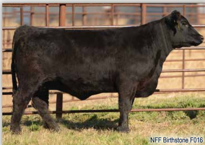
NFF Birthstone F016

PE to SS Great Northern H52, AAA#18300655 confirmed safe estimated due 3/20/20.