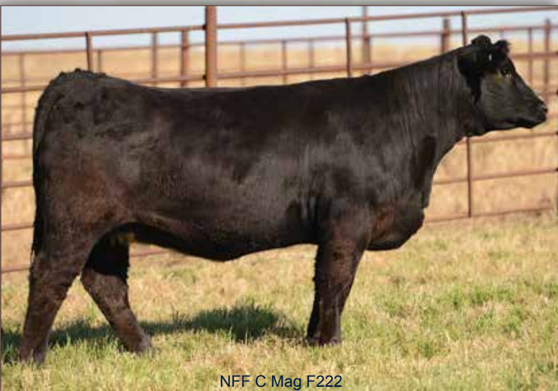
NFF C Mag F222