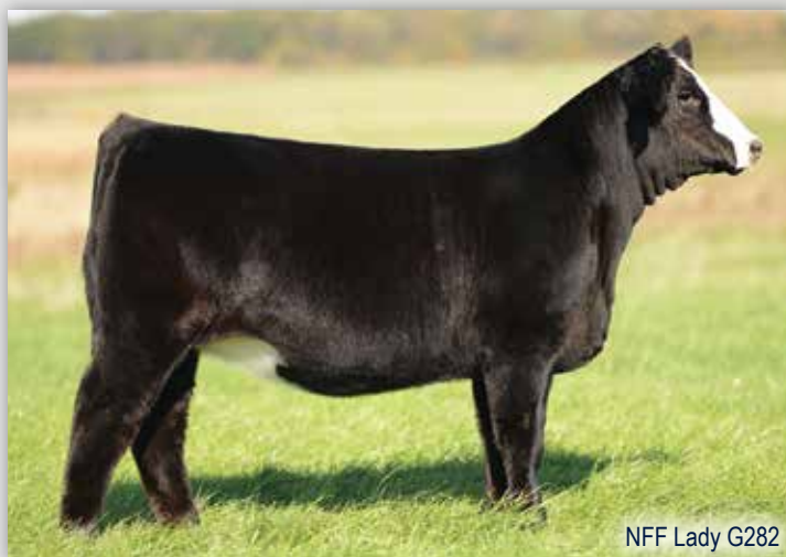
NFF Lady G282

A striking Baldy female that has the look, presence, and shear quality necessary to follow in the footsteps of her dominant full sister. G282 is a member of one of the most dynamic flushes ever created at NFF and we couldn't be more excited to share these females with you on December 6, 2019!