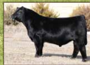
W/C Relentless 32C - ref. sire

NFF Snowball G129 comes to us from the hottest and most consistent sire group in the country. W/C Relentless 32C took the business by storm this summer during the AJSA Summer Classic in Louisville, Kentucky where he sired the Grand, Reserve Grand, and Fifth Overall Purebred Simmental females. He sired as many class winners, division and reserve division champions, and put more females in the top 20 than any other Purebred sire option. This female and her sister combine the influence of the great 8543U matron, producing in excess of $8 Million in progeny sales with the impact of NFF Snowball Y062. Cow power lines her pedigree!