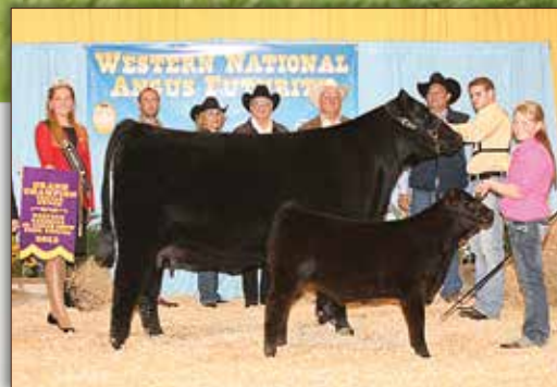
EXAR Frontier Gal 1405 - reference granddam

NFF WB Frontier Gal G244 is a captivating Angus female that we believe has the credential to be a big-league show heifer and donor when her time at the end of a leather lead comes to an end. Her pedigree is lined with Angus matrons of great significance within the business and her phenotype suggests she will one day join that list. Her dam is the $40,000 sale feature from the Express Ranches Honor Role sale in 2015 that traces to the great WCC Frontier Gal 39, argued as one of the most important females in the Express Ranches program. Sired by Roundtable and influenced by sires such as PVF Insight, and Dameron First Class there is simply no denying the elite pedigree that supports G244. A true sale feature and an absolute must see on December 6th if you're a serious Angus enthusiast!