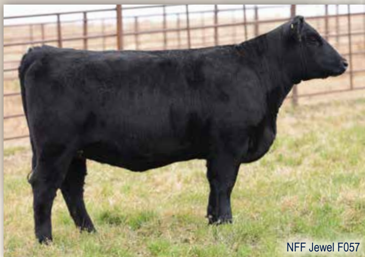
NFF Jewel F057

PE to SS Great Northern H52, AAA#18300655 confirmed safe estimated due 2/25/20.