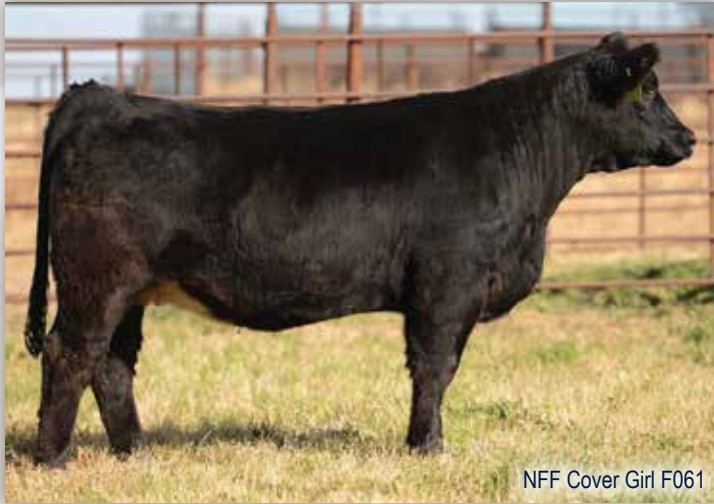
NFF Cover Girl F061

ZKCC Easy Rider and Lo-Boy were our selections from Kraenow Cattle Co. They are the Pilgrim influenced sons of the full sister to the legend, ZKCC Chopper. The maternal power and balance of pedigree, curb appeal, and longevity are all inclusive in the stock sired by these two full brothers. The 824 donor dam has as much impact in the entire offering as any one cow and when you line it up, it's our opinion that it only gets better. The maternal granddam of this offering of bred cattle is one that was admired by many in her early years and brought the Kraenow program to the forefront. They won't have the indicators in their favor on paper, but they will have the look and style that everyone runs to Stillwater for.