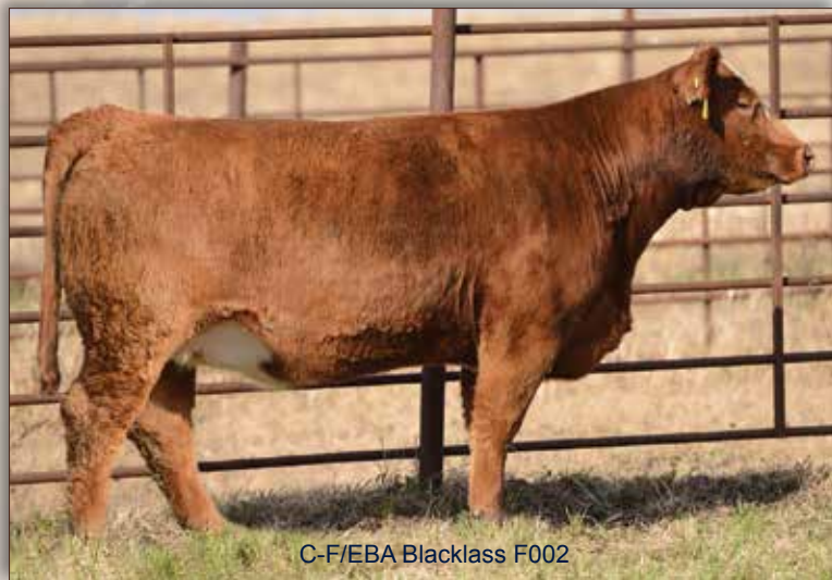
C-F/EBA Blacklass F002

PE to KCC1 Carver 284E, ASA#3353408 or KCC1 Carver 512E, ASA#3353411 confirmed safe estimated due 3/25/20.