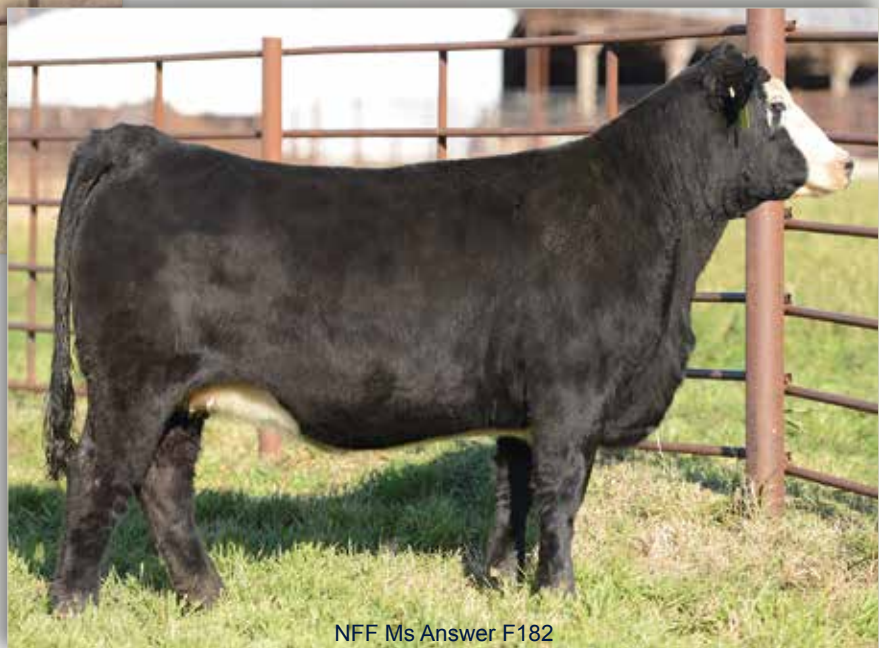
NFF Ms Answer F182