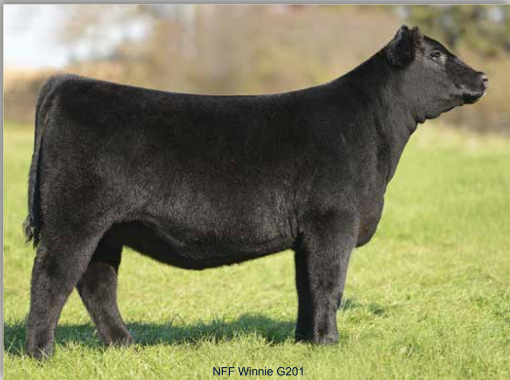
NFF Winnie G201

NFF Winnie G201 is sired by the popular S&R Roundtable J328 and backed by the foundation Angus female WK Winnie 7305, one of the premier matrons in the Express Ranches program. There is no denying the impact of Roundtable sired females back to First Class and First Impression females. This February prospect is big boned, wide based, and offers the show ring presence that we admire! Her design, stoutness, and sheer quality of cow family is what sets her apart as an elite show heifer and breeding piece!