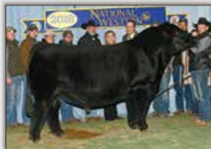
SC Pay The Price C11 - ref. sire