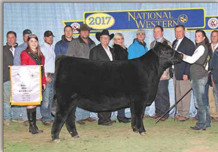
EXAR Princess 5633 - reference dam

NFF WB Princess G255 is sired by PVF Surveillance 4129 and backed by the influence of the First Class x Princess line. The powerful donor dam of G255 is EXAR Princess 5633, the $95,000 heifer calf in the 2015 Big Event at Express Ranches. 5633 is a full sister to the popular C&C Priority, the sire of the 2015 NJAS Grand Champion Angus Female for Prairie View Farms. The maternal great granddam of G255 is the immortal Greens Princess 1012, a National Triple Crown winning female and dam of countless National Champions, High Sellers, donor matrons, and AI sires of significance. G255 is massive in her foot and bone work, wide based, bold bodied, and has been blessed with the added hair. Her presence and poised look is further complimented by her royal pedigree that runs generations deep with power cows of significance within the Angus breed!