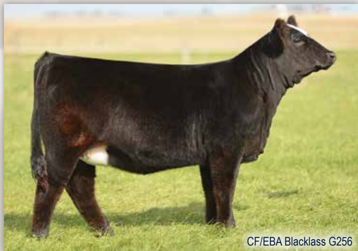
CF/EBA Blacklass G256