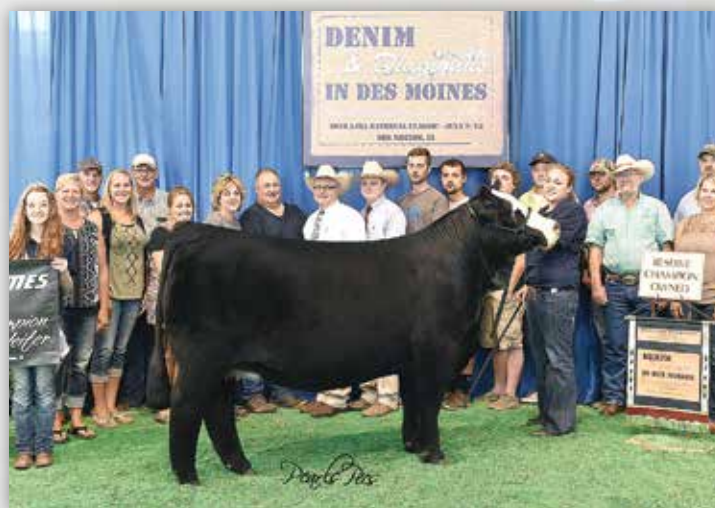
Ruby NFF Rhythm 4B1 - 2016 AJSA Grand Champion Owned Purebred Female - Full Sister in blood to Sire of Lot 51