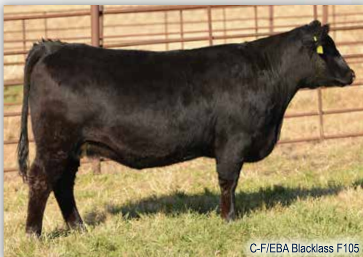
C-F/EBA Blacklass F105