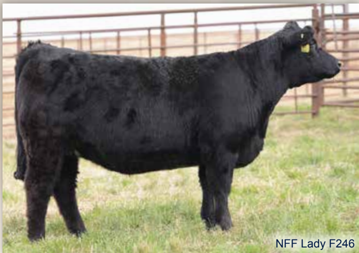
NFF Lady F246