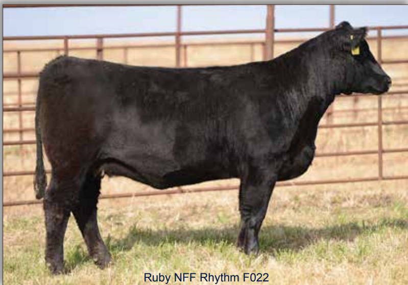
Ruby NFF Rhythm F022