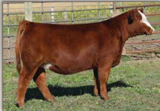
C-F EBA Blacklass E013 sold in the 1st DreamWorks sale for $15,000