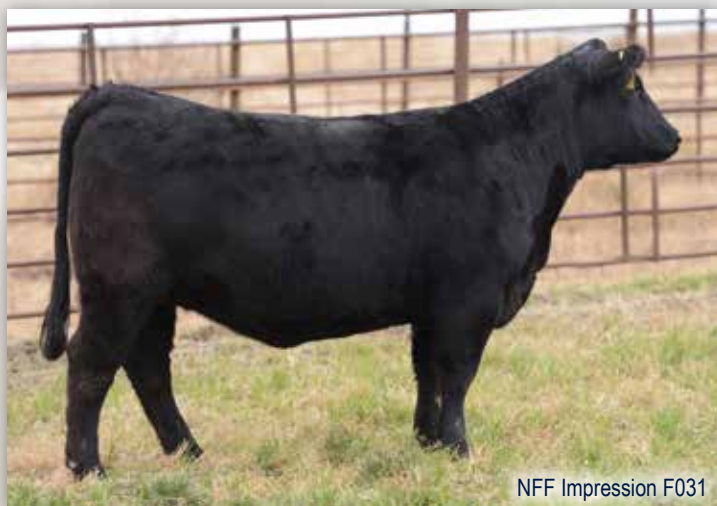
NFF Impression F031