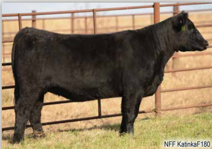
NFF Katinka F180

Ultrasound Info Safe AI, Bull calf estimated due 1/19/20