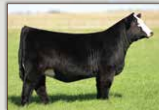
Full sib to Lot 17

With great enthusiasm and pleasure we welcome you to the 2019 edition of Dream Works! The opportunity to do business with one of the truly great beef cattle families is yours for the taking on December 6th.