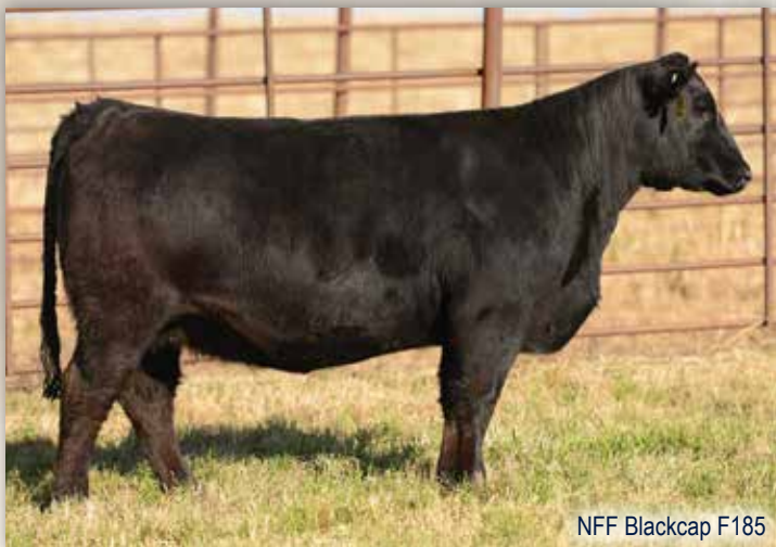
NFF Blackcap F185

This trio of females are full sisters to the 2018 High Selling Angus open heifer calf that was purchased a year ago for $20,000 by Julianna Wise of Decorah, Iowa. These females are supported by the influence of the great C&C Blackcap 4002, a massive bodied, good build, attractive daughter of EXAR Denver and backed by the potent Blackcap tribe. These females are attractive, big centered, powerful, and loaded with mass from end to end. We have always admired the basic build, three-dimensional look, and overall presence that this flush of sisters offers. F071 is a sensibly sized, big centered, good footed female that is balanced, stout, and modern in her look. F202 is big boned, stout pinned, wide bodied, and poses with a brood cow look. F185 is the attractive, refined featured, bold centered, easy keeping female that is hard to ignore. She is safe to the popular Eathington Sub Zero stud with a heifer calf pregnancy due in January. Rest assured of the productivity and longevity that these foundation Angus females will offer!