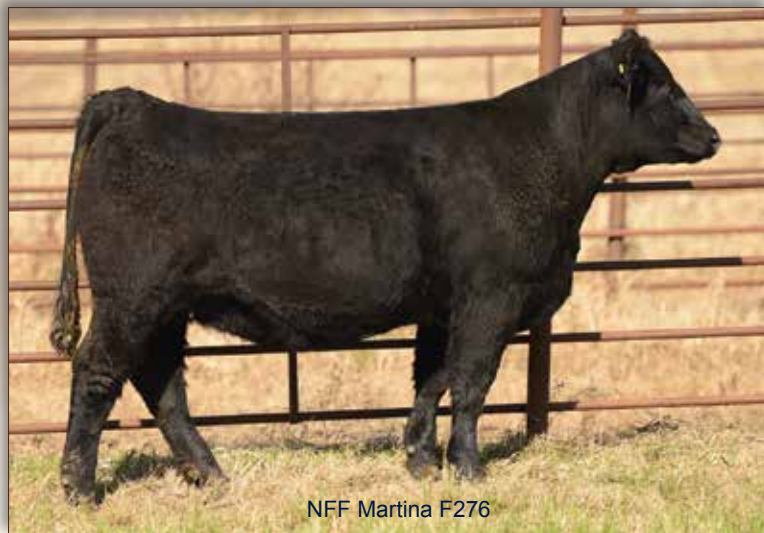
NFF Martina F276