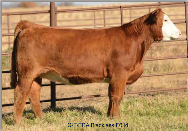
C-F/EBA Blacklass F014