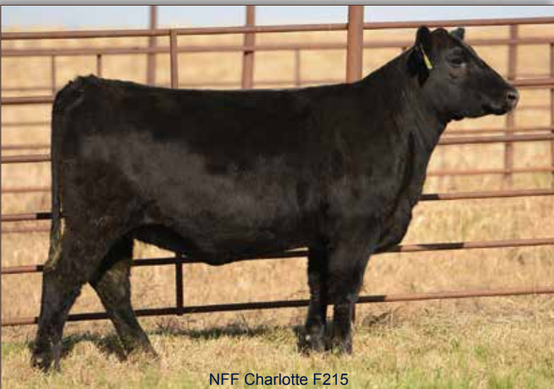
NFF Charlotte F215