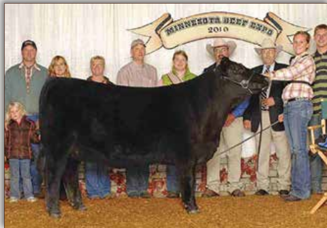
RCC-NFF Wicked - reference granddam

NFF Wicked G177 is the donor prospect of the offering and there is simply no denying the mass, volume, capacity, and shear density that this red hided Purebred female offers. She is sired by the Steel Force x 770P stud known as Big Deal, the late herd sire for Mid Continent Farms, Oak Ridge, Bellar, and Wesner. Her dam is from the potent NFF Wicked W9039 tribe that has contributed so much for outfits across the country. This is the same cow line that produced Wicked B125, a leading donor for Ruby and Shipwreck that continues to produce five-figure progeny and show ring champions, including the Reserve Grand Simmental Female at both the Houston and San Antonio Junior Heifer Shows. If a powerful, massive design Red head is what you're hunting to campaign and then implement into your program as a foundation building breeding piece, then here is your girl on December 6!