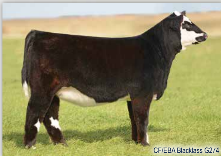
CF/EBA Blacklass G274

G274 is another flush sister by Big Deal and from the prolific A24 matron that was produced in the Mindemann Farms program at Sullivan, Wisconsin. She too boasts the added chrome look, with an unsurpassed amount of stoutness genuine width, and real-world performance. This big centered brockle faced female is sure to turn some heads!