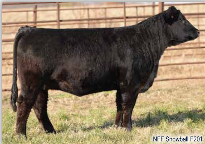
NFF Snowball F201

PE to KCC1 Carver 284E, ASA#3353408 or KCC1 Carver 512E, ASA#3353411 confirmed safe estimated due 2/20/20.