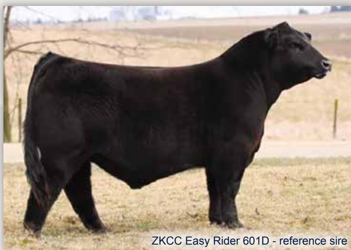
ZKCC Easy Rider 601D - reference sire