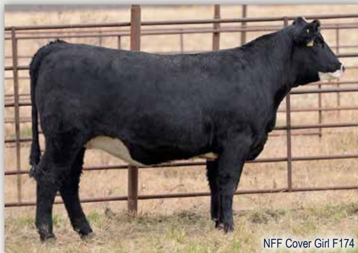
NFF Cover Girl F174

PE to KCC1 Carver 284E, ASA#3353408 or KCC1 Carver 512E, ASA#3353411 confirmed safe estimated due 3/12/20.