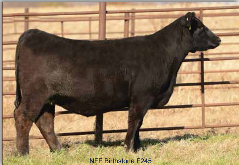
NFF Birthstone F245