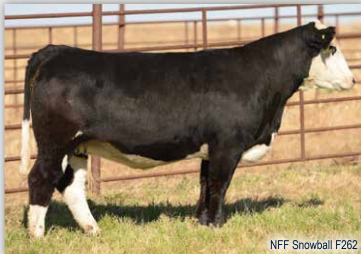
NFF Snowball F262