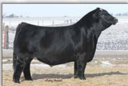
GSC GCCO Dew North - ref AI sire