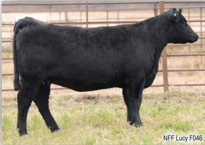
NFF Lucy F046