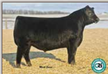
Eathington Sub Zero - Service sire to many females in the offering