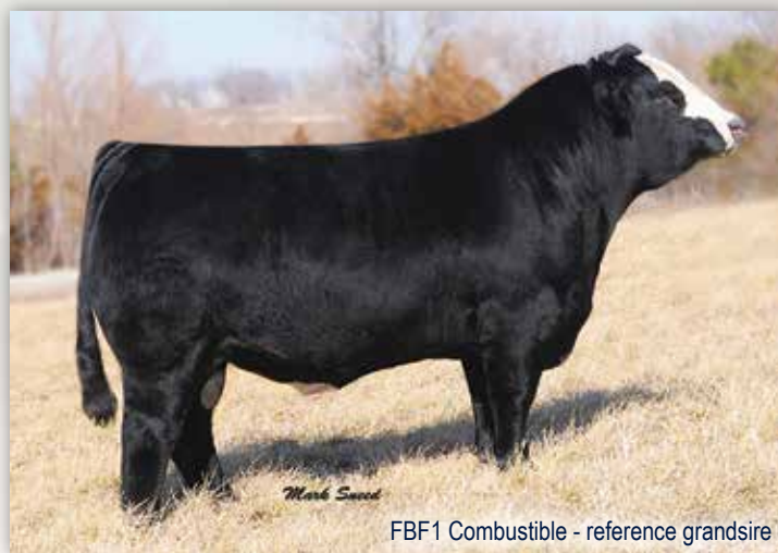
FBF1 Combustible - reference grandsire