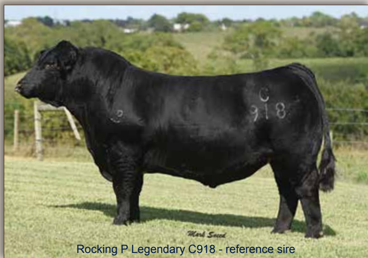
Rocking P Legendary C918 - reference sire

The Legendary cattle have turned heads of many over the past couple of years. Early on, breeders treaded lightly with much hesitation. His near outcross pedigree brought folks to the table in the beginning and now, nearly three years later, he will be one of the heaviest used bulls in the 2019/2020 breeding seasons. His walking service influences the Moriondo Farms program of Missouri. His first breeding age sons will be highlights in their upcoming bull sale. Those cattle have extra shape, length, and tremendous post weaning gains. Legendary is the sire of the 2020 Embryos on Snow headliner, Berwick, that will in turn be one of the few, most sought after bulls in the breed, further proving the breeding value of his service. There will be more to come over the next few years from Legendary.