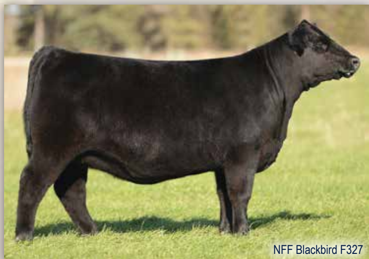
NFF Blackbird F327

NFF Charlotte G071 is sired by Eathington Sub-Zero and backed by NFF Charlotte C012, a female that offers a different pedigree than the balance of the offering. With no Style, Primo, First Class, or Insight identified within her pedigree, there are unlimited mating options to the more popular sire choices within the business. Here is the opportunity to tie to a powerful, long fronted, up-headed January prospect that offers tremendous promise on the tan bark and in the pasture!