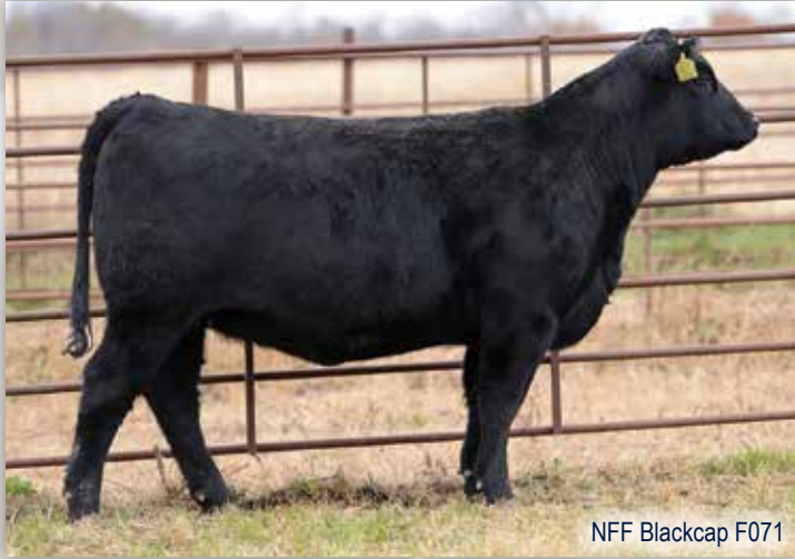
NFF Blackcap F071