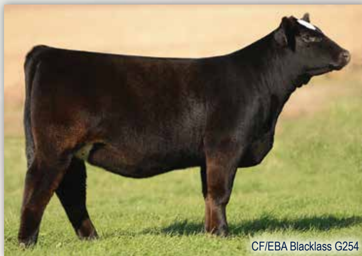
CF/EBA Blacklass G254

G254 is the more conservatively marked sister from the Big Deal x A24 flush. She is a long, smooth fronted female that lays in neatly at the point of her shoulder, yet transitions into a bold and robust rib cage. Her hip and hind leg structure sets down with authority, and she offers just a shot of white in the middle of her forehead to garner that "extra" look of class!