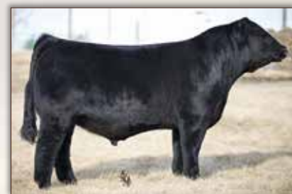
Ruby SWC Battle Cry 431B - ref. sire