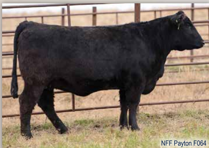
NFF Payton F064

PE to SS Great Northern H52, AAA#18300655 confirmed safe estimated due 3/22/20.