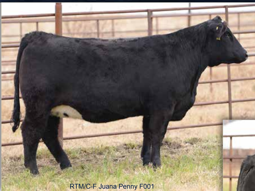
RTM/C-F Juana Penny F001