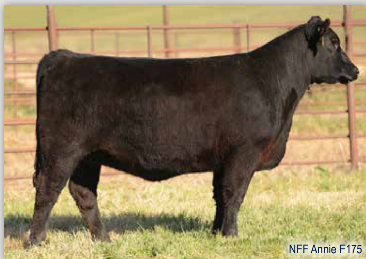
NFF Annie F175

PE to SS Great Northern H52, AAA#18300655 confirmed safe estimated due 2/5/20.