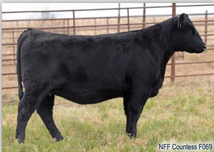
NFF Countess F069

PE to SS Great Northern H52, AAA#18300655 confirmed safe estimated due 2/25/20.