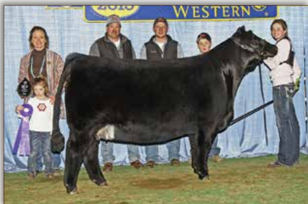
Mindemann Blacklass A24 - reference dam