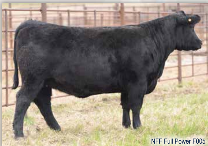
NFF Full Power F005

S&R Roundtable J328 has evolved as one of the most influential sires when utilized back on First Class daughters and that mating has been proven time after time by outfits like Express Ranches. The females by Roundtable in this year's offering bring forth the right amount of body mass, dimension, and maternal capacity. They are backed by generations of proven, hardworking cow families that raise big calves, offer a quality look of balance, and added longevity. This set of Roundtable daughters all sell safe in calf to S S Great Northern H52, a proven heifer bull that is influenced by Hoover Dam and ranks among the elite 1% of the breed for CED with a +17 and among the top 1% of the breed for BW with a -4.7 BW EPD. He is a big spread bull that stretches to over 110 at a year, while charting top 2% for $G and top 1% $B. This herd sire has done an exceptional job in our program and we are confident in the convenience of his calving ease capabilities on first time heifers!