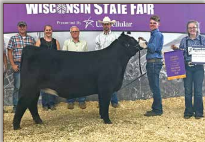
2018 Wisconsin State Fair Supreme Champion – Full Sister to Lots 6-8

Without question this trio of sisters may very well be from the most consistent and proven mating on the farm, and if one isn't enough to convince you of this status, then three surely will! We are excited to introduce to you G295, G282, and G045 from the famed W/C Relentless 32C x NFF Lady A193 mating that produced the 2018 Wisconsin State Fair Supreme Champion Female Overall Breeds! In the inaugural sale this mating averaged just a shot under $10,000 a round and produced NFF Lady E134, the $16,000 female that cut a wide swath on the show circuit, being named Supreme Grand Champion or Reserve Supreme Grand Champion female 7 different times for the Walsh Brothers of Wisconsin. G295 is the first of these sisters and without a doubt one of the uniquely interesting three-quarter blood females we have ever raised. She is massive in her foot and bone work, wide based, big hippered, wide pinned, and when set in motion handles her spine and topline with comfort. Her presence is second to none, with a quality look of balance.