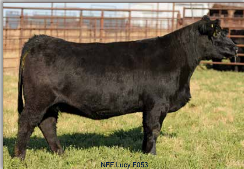
NFF Lucy F053

The Legendary cattle have turned heads of many over the past couple of years. Early on, breeders treaded lightly with much hesitation. His near outcross pedigree brought folks to the table in the beginning and now, nearly three years later, he will be one of the heaviest used bulls in the 2019/2020 breeding seasons. His walking service influences the Moriondo Farms program of Missouri. His first breeding age sons will be highlights in their upcoming bull sale. Those cattle have extra shape, length, and tremendous post weaning gains. Legendary is the sire of the 2020 Embryos on Snow headliner, Berwick, that will in turn be one of the few, most sought after bulls in the breed, further proving the breeding value of his service. There will be more to come over the next few years from Legendary.