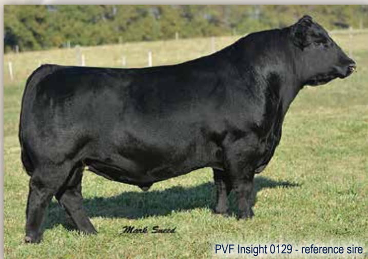
PVF Insight 0129 - reference sire

PE to SS Great Northern H52, AAA#18300655 confirmed safe estimated due 3/17/20.