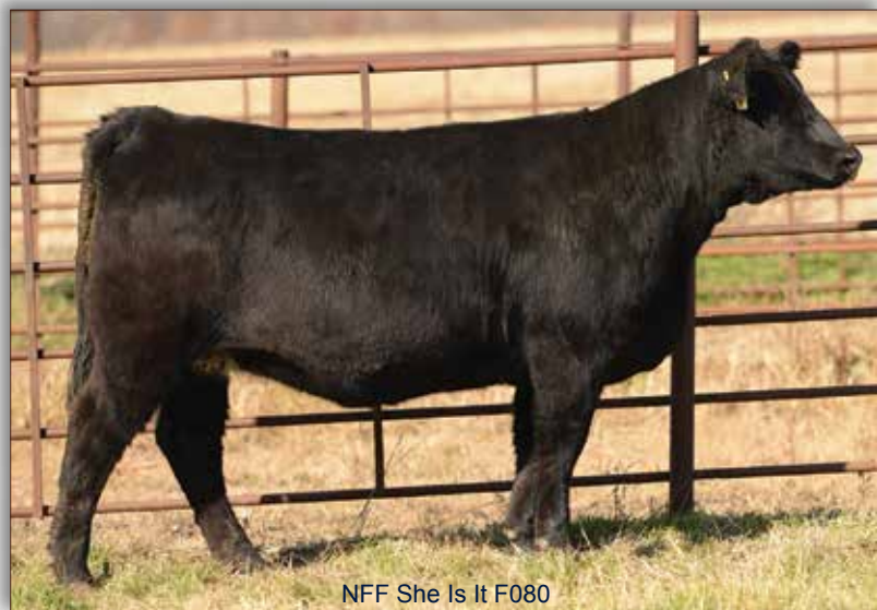
NFF She Is It F080