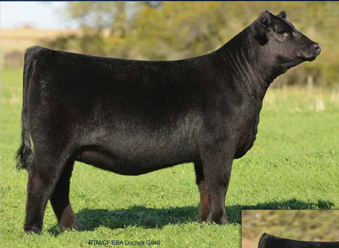
RTM/CF/EBA Duchess G046