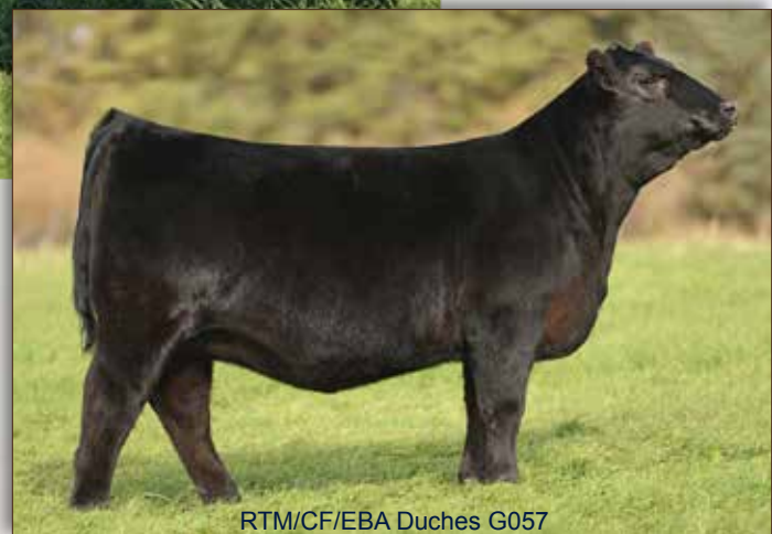
RTM/CF/EBA Duchess G057