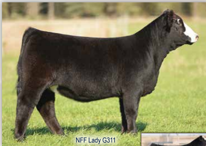
NFF Lady G311

NFF Lady G311 is the fourth sister from the NFF Lady A193 matron. A193 is the dam of the 2018 Wisconsin State Fair Supreme and is a daughter of Ruby Yukon Y108, the Built Right x Rhythm 418P stud. This blaze faced beauty has "the look" that is necessary to be a force on the tan bark, yet still is backed by the potent cow family to offer consistent production success. If you're in the market for a March Percentage show heifer prospect to haul to Grand Island for the 2020 AJSA Summer Classic, then this female deserves a hard look!