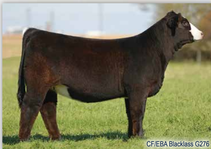
CF/EBA Blacklass G276

G276 is the perfect marked baldy sister that has just a shot of white in her underline and boasts the elegant, refined, super attractive look that is so hard to deny in the show ring. This female is upheaded, flat necked, smooth shouldered, and offer the attractive set to her hip and hind leg. She is maybe a shot greener in her condition than her sisters, but offers the right turn and sweep to her rib design in order to make an impressive yearling next summer and fall for her new owner. Pay attention to the quality of build, look, and cow family that can be found here!