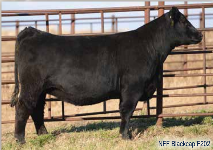
NFF Blackcap F202

PE to SS Great Northern H52, AAA#18300655 confirmed safe estimated due 3/12/20.