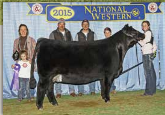
Mindemann Blacklass A24 - reference dam

WLE Big Deal A617 strikes again with this powerful flush of three-quarter blood show heifer prospect that certainly won't be missed! G250 is a March three-quarter blood prospect that has the look, presence, structure, and stoutness to be noticed. Her added shot of chrome is sure to draw in the attention of any person sorting a show. She is a moderate framed, wide based, bold ribbed, big hipped female that offers some unique pieces from a production standpoint and is without a doubt a female we could see finding her way into a show steer production setting due to her added stoutness, style, and presence.