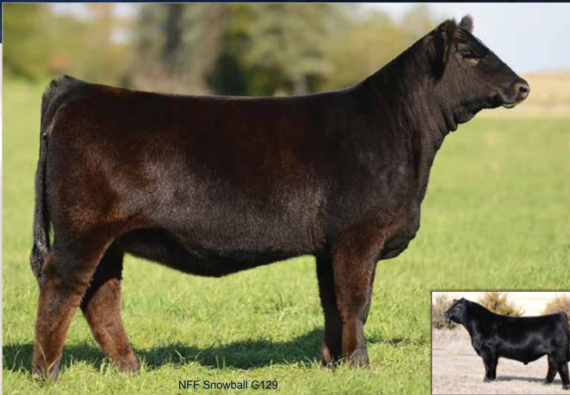
NFF Snowball G129