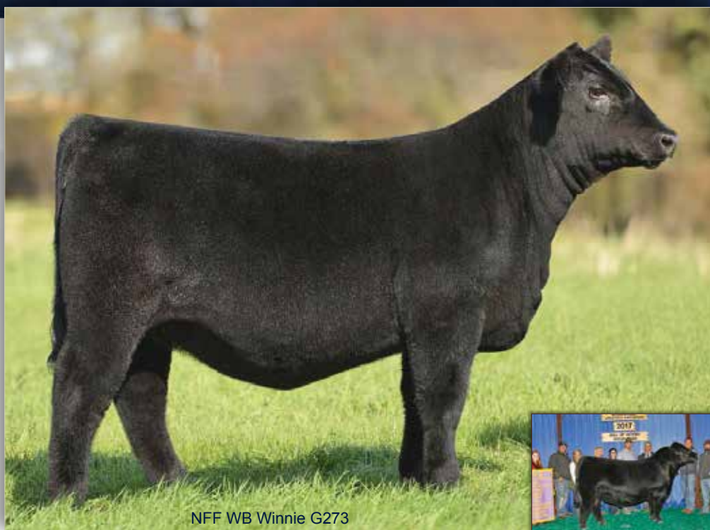
NFF WB Winnie G273