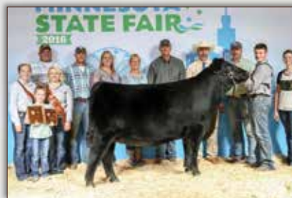
RTM Juana Penny C507 - ref. dam