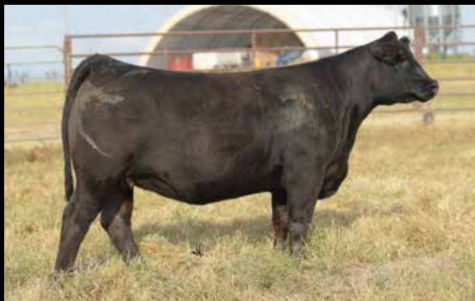
LOT 6 HANELS MISS 2020 F8056

DOB: 1/27/18 Reg: 3488704 ID: F8130 Breed: 1/2 SM 1/2 AN Sire: CONNEALY CAPITALIST 028 Dam: HANELS MISS WAR X0211 MGS: SFI WARRIOR R45L CE: 13.4 BW: 0.2 WW: 67.9 YW: 106.6 MCE: 5.9 MLK: 22.4 MWW: 56.3 STY: 19.9 CW: 34.2 YG: -0.18 MRB: 0.25 BF: -0.04 REA: 0.58 SF: -0.3 ADJ BW: 78 ADJ WW: 596 API: 139.8 TI: 72.1 SERVICE SIRE: CCR BOULDER 1339A SERVICE DATE: 4/3/19 DUE DATE: 1/13/20