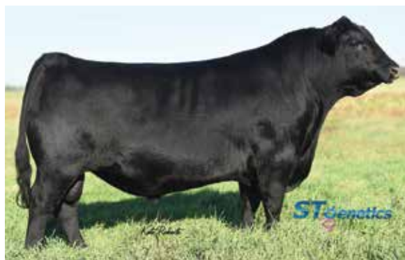
SERVICE SIRE TO THE COMMERCIAL FEMALES MGR TREASURE