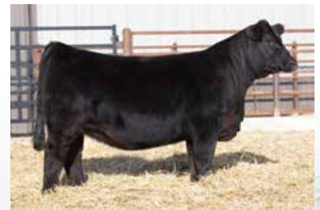
Emoji 703E - Donor of Lot 103 Emrbyos