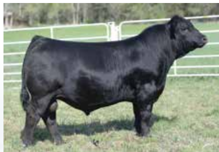
Proclamation E202 - Sire of Lot 103 Emrbyos

Offering 3 conventional number 1 embryos, guaranteeing 1 pregnancy if transferred by a certified technician. All shipping costs are the responsibility of the buyer.