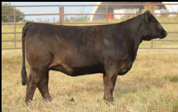
LOT 9 HANELS MISS COM F8076

DOB: 2/17/18 Reg: 3488727 ID: F8180 Breed: 3/4 SM 1/4 AN Sire: HANELS TOP TEN D6012 Dam: T795 DRIVE HBS MGS: HC POWER DRIVE 88H CE: 8.9 BW: 2.9 WW: 74.9 YW: 109.8 MCE: 4.8 MLK: 21.1 MWW: 58.4 STY: 17.1 CW: 24.2 YG: -0.38 MRB: -0.02 BF: -0.09 REA: 0.72 SF: -0.29 ADJ BW: 93 ADJ WW: 668 API: 121.6 TI: 70.4 SERVICE SIRE: CONNEALY BLACKHAWK 6198 SERVICE DATE: 4/3/19 DUE DATE: 1/13/20