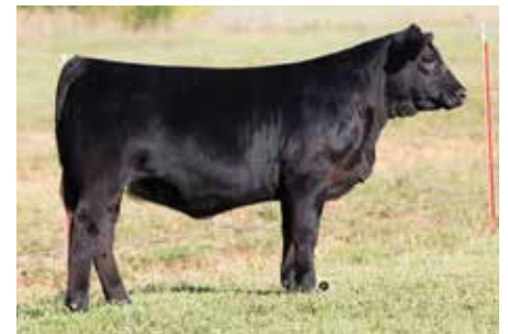
Ms Attractio Y85 - Donor of Lot 102 Emrbyos