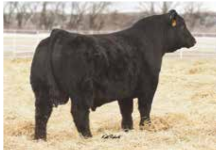
Blueprint D47 - Sire of Lot 101 Emrbyos

Offering 3 conventional number 1 embryos, guaranteeing 1 pregnancy if transferred by a certified technician. All shipping costs are the responsibility of the buyer.