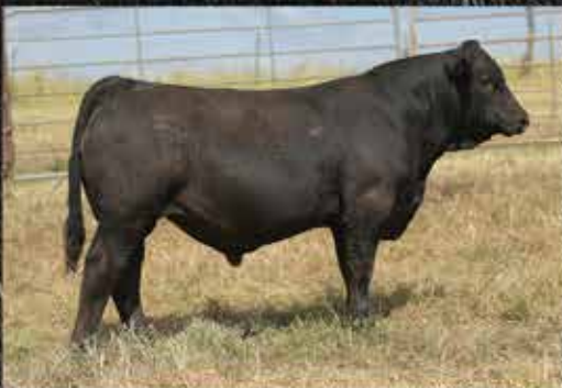
3/4 Simmental 1/4 Angus