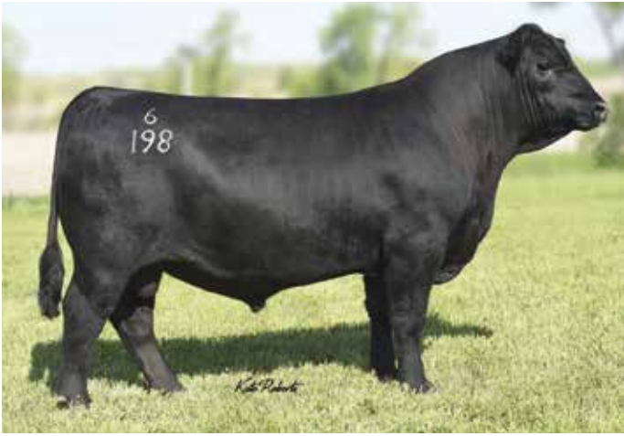
SERVICE SIRE TO THE REGISTERED FEMALES CONNEALY BLACKHAWK 6198