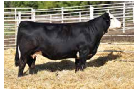
TJ 41Z - Donor of Lot 100 Emrbyos