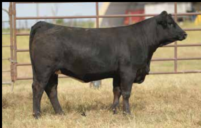
LOT 17 HANELS MISS UNITED F8135