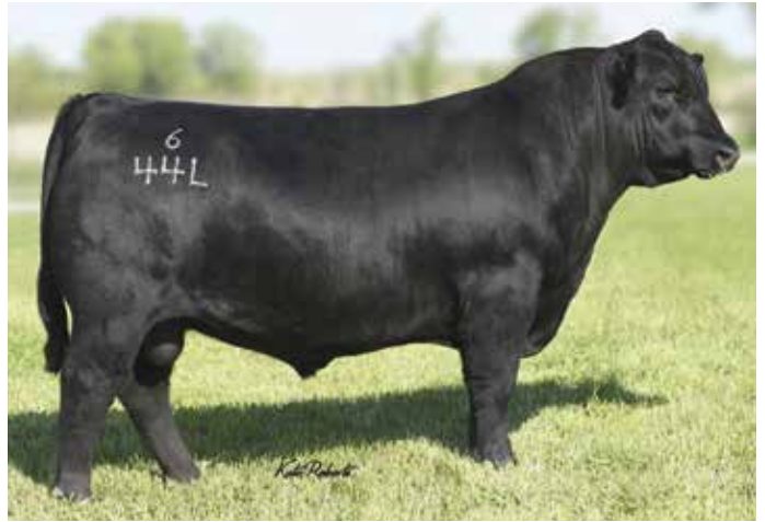
SERVICE SIRE TO THE REGISTERED FEMALES CONNEALY LEGENDARY 644L