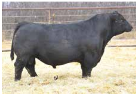
Main Event 503B - Sire of Lot 102 Emrbyos

Offering 3 conventional number 1 embryos, guaranteeing 1 pregnancy if transferred by a certified technician. All shipping costs are the responsibility of the buyer.