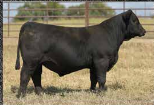
3/4 Simmental 1/4 Angus