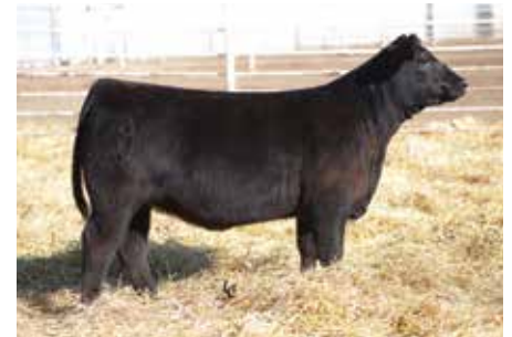
Miss 63F - Donor of Lot 101 Emrbyos