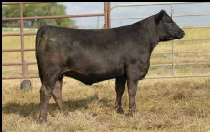
LOT 19 HANELS MISS UNITED F8143

DOB: 3/10/18 Reg: 3488671 ID: F8214 Breed: PB SM Sire: HANELS DOUBLE B4252 Dam: HANELS MISS TANKER A3242 MGS: TNT TANKER U263 CE: 9.2 BW: 1.5 WW: 73.5 YW: 108.6 MCE: 6 MLK: 23.6 MWW: 60.3 STY: 20.4 CW: 37.3 YG: -0.5 MRB: -0.04 BF: -0.12 REA: 0.97 SF: -0.39 ADJ BW: 81 ADJ WW: 662 API: 130.1 TI: 71.6 SERVICE SIRE: HANELS CAPITALIST F8102 SERVICE DATE: 5/17/19 DUE DATE: 2/26/20