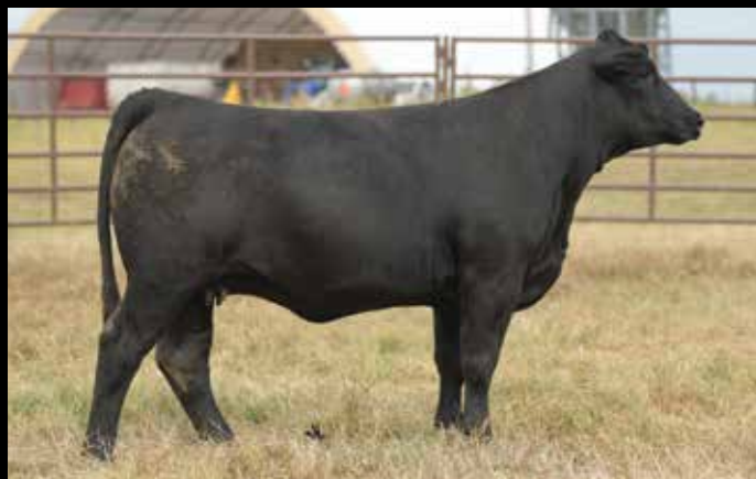
LOT 7 HANELS MISS CUT F8066