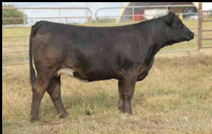
LOT 4 HANELS MISS CUT F8047