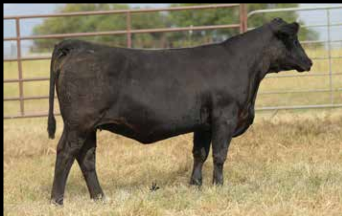
LOT 23 HANELS MISS TEN F8172