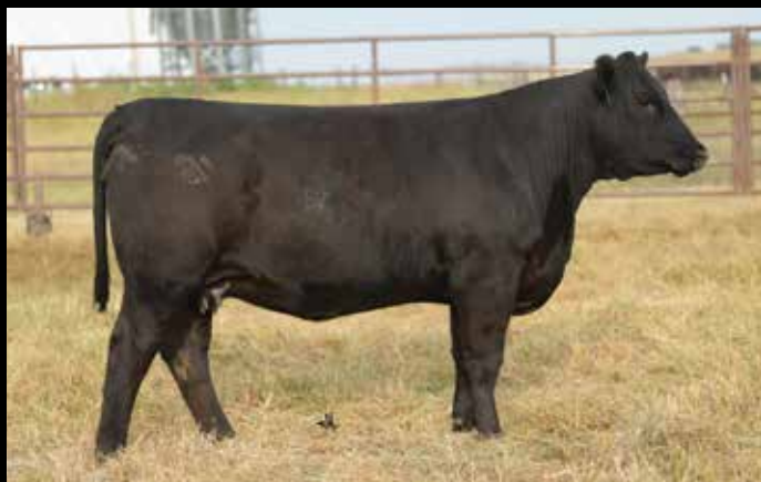
LOT 1 HANELS MISS TEN F8001

DOB: 1/14/18 Reg: 3488709 ID: F8071 Breed: 3/4 SM 1/4 AN Sire: HANELS PER VISION 2020 Dam: HANELS MISS HUMMER X009 MGS: HC HUMMER 12M CE: 11.5 BW: 1.2 WW: 75.2 YW: 116.1 MCE: 6 MLK: 25.4 MWW: 63 STY: 19.3 CW: 46.2 YG: -0.36 MRB: 0.06 BF: -0.10 REA: 0.84 SF: -0.38 ADJ BW: 82 ADJ WW: 604 API: 127.1 TI: 71.2 SERVICE SIRE: CONNEALY COMRADE 1385 SERVICE DATE: 4/3/19 DUE DATE: 1/13/20