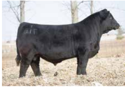
Turnpike 771E - Sire of Lot 100 Emrbyos

Offering 3 conventional number 1 embryos, guaranteeing 1 pregnancy if transferred by a certified technician. All shipping costs are the responsibility of the buyer.