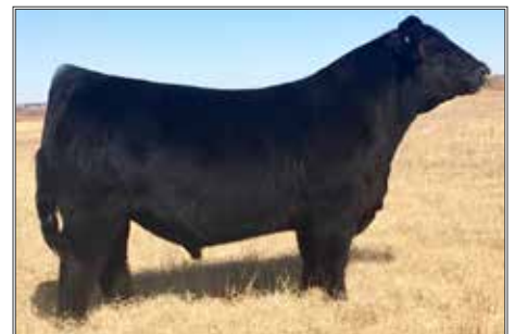
WLTR GRAND OLE OPRY 12E SIRE OF LOT 42

A maternal sib to WLTR Two Steps Ahead 27C, the highly competitive sire owned by Sublette Cattle Co, who gathered his share of banners including Grand Champion Purebred Bull at the 2017 Ft Worth Stock Show. This female screams COW POWER!!! Her extra punch and power is accompanied by an abundance of center rib and overall performance. With all that, this female still maintains a very maternal look with plenty of symmetry and presence for the tanbark. This is the type and kind of female that will keep you in the business. This one has the potential to lay down and have the next high caliber herd sire, after all, it runs in the family!!