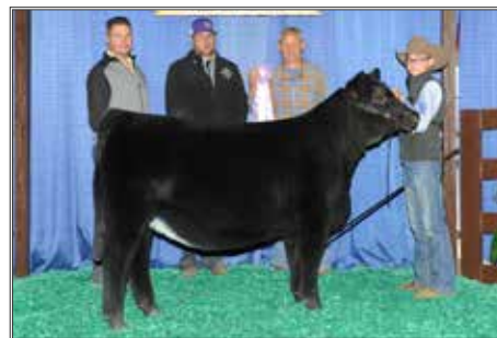
NAILE RESERVE DIVISION CHAMPION FULL SISTER TO LOT 25