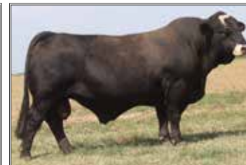
LMC MANZIEL 5B/2 SIRE OF LOT 45B