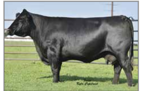
ANGELS GLAMOUR T20 MATERNAL GRANDDAM OF LOTS 3-9