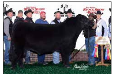
WLTR TWO STEPS AHEAD MATERNAL BROTHER TO LOT 42