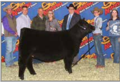
DTF RELENTLESS GIRL FULL SISTER TO LOT 34 EMBRYOS