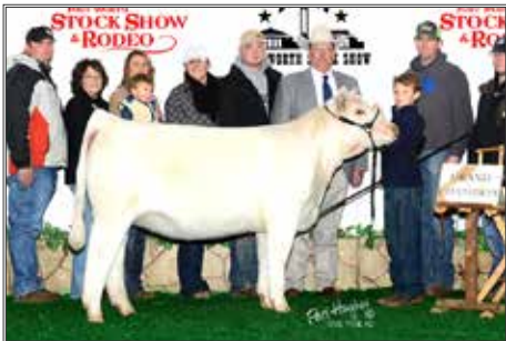
LJR MS TIGER LILLY 2041C DAM OF LOT 70 & 71 2016 FWSS GRAND CHAMPION CHAROLAIS FEMALE

OFFERED BY SHIPWRECK CATTLE / JACKSON CATTLE COMPANY