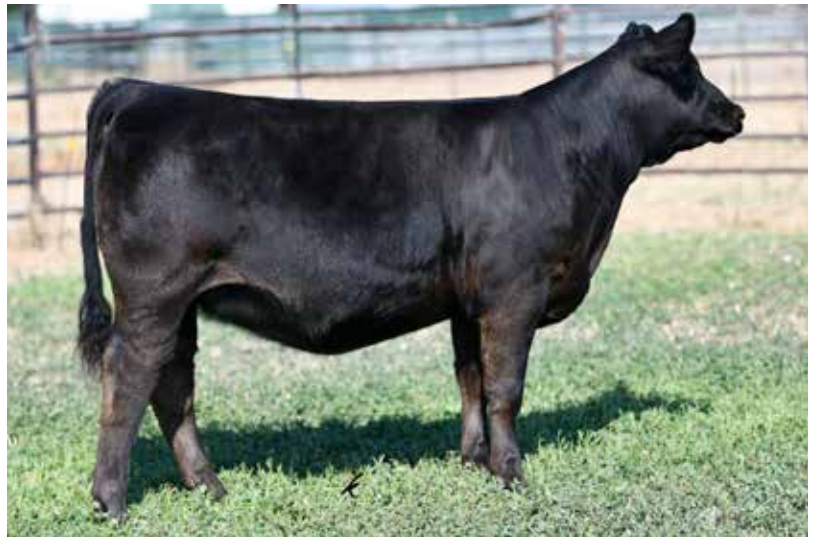
FBFS GET A GIRL 904G OFFERED BY FOSTER BROS. FARMS

What an interesting female that combines the ideal flexibility for any exhibitor with extra breeder type merit. Her dam was our selection from the 2018 bred heifer offering at Cow Camp Ranch in Kansas. The bottom side lineage reads with diversification in mind and we believe the mating to Blacklist yielded a near perfect blend. This young female is extended and refined to a high degree with elegant design and balances effortlessly from the profile. The FBF cattle are Super Bowl eligible, and they would like to retain 12 embryos at the buyer's convenience and FBF's expense within the first 3 years of production.