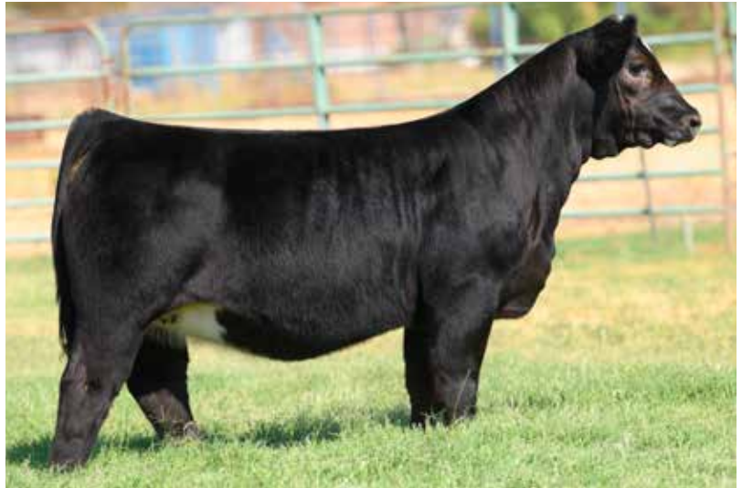
JCBB GABBY G9920 OFFERED BY BIRD CATTLE COMPANY

DMCC Dinero 2D, another popular sire group from Bird Cattle Company of Lubbock, Texas! Here is a 3/4-blood female that is backed by the Broker sired dam that came from Tim Schaeffer of Indiana. S&S Ms Kate 6047D is a good looking, sound, functional half-blood female that offers the length and scale to perfectly match with the moderate, powerful, good looking Dinero stud! Study her angles, balance, and genuine shape on sale day!