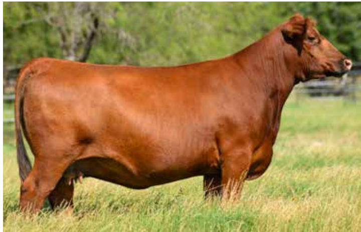
WR MS ROBIN 11B