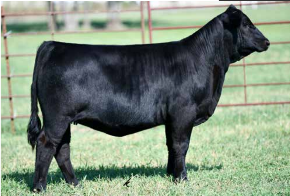
JSSC ANGELS GLAMOUR 902G OFFERED BY SEALE SHOW CATTLE

As we study the females individually, 902G is extremely impressive from a balance and symmetry stand point. One that has a huge mid side and extended through her front end. When studied from behind she shows more than ample muscle and skeletal width. When put into motion this female simply oats across the pen. One that we feel can compete on any stage! We next look at 903G heifer. One that is huge hipped and bold sprung through the middle of her rib cage, extremely trim and elegant through her head and shoulder. One that we think will do nothing but get better with age. 904G is the third of the sisters that sell today, but don't let that fool you. She is extremely complete and great in terms of her structural design. Once again the cattle that come from this legendary Cow family do nothing but get better with age. We feel this female could be a great bred next year.