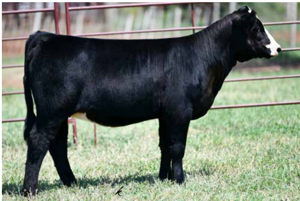
JSSC ANGELS GLAMOUR 935G

If this blaze faced female doesn't get you excited then I quit! She's long and feminine featured, with a tremendous amount of bone and foot. One that is perfect from the side and still packs a punch when viewed from behind. She is sired by the champion maker, Counter Attack, which only adds to the equation!