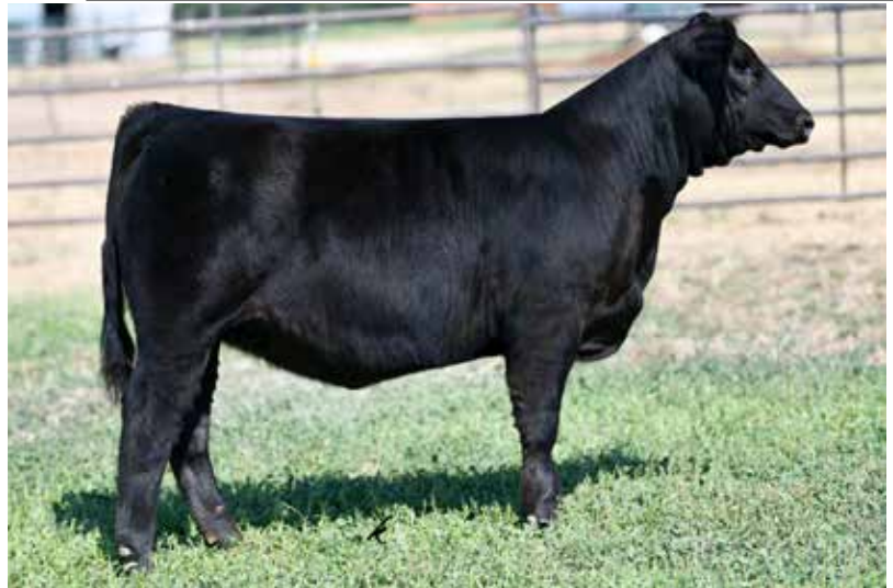
FBFS GIRL POWER 901G OFFERED BY FOSTER BROS. FARMS

FBFS Girl Power 901G is a member of the rookie calf crop that is sired by the $120,000 ETR Blitz 208E, the 2018 American Royal Grand Champion Simmental Bull and 2018 NAILE Reserve Grand Champion Simmental Bull. Blitz is a top Profit son that is proving himself as a true breeding bull. Study the stoutness of foot and bone that is accompanied by a sound structural base, and a look from the profile that is hard to ignore! The FBF cattle are Super Bowl eligible, and they would like to retain 12 embryos at the buyer's convenience and FBF's expense within the first 3 years of production. This female is entered in the NAILE.