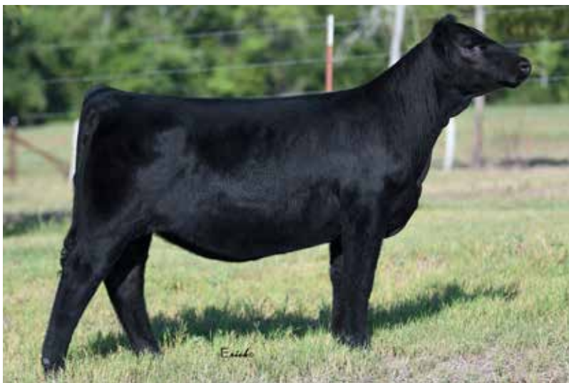
SJCC GIZELLE G020 OFFERED BY SOUTHERN JEWEL CATTLE COMPANY