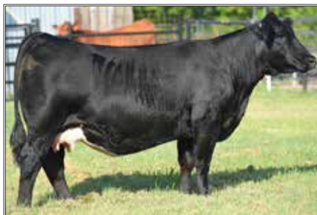
SWC HOC ANNIE K 214C DAM OF LOT 46 & 47 MATERNAL SISTER TO DAM OF LOT 48