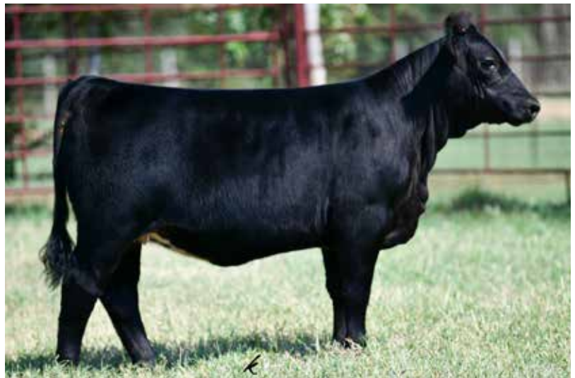
JSSC MISS BLACKCAP 907G OFFERED BY SEALE SHOW CATTLE

This Currency sired half blood really gets us excited. She stems from the great FCC Blackcap 1943 cow that graced the pastures of Lockney for many years before becoming a BLE sale feature. The 1943 female was truly a magnificent animal with more power and substance than most Angus females. This females mother is the result of breeding that great Angus cow to a Maine bull, called Hot Commodity. Which means this girl can be dual registered! As you study this female on the hoof, she is one that flows from nose to tail with elegance and balance. Extremely angular about her head and neck. With a great spring of rib and stands on and absolute perfect structure. This will be one you won't want to miss!