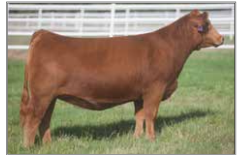
BLC1 EVELYN 476E DAM OF LOT 23