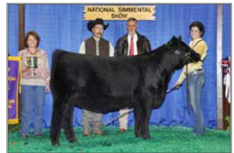
2011 NAILE GRAND CHAMPION FEMALE DAM OF LOT 37