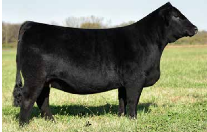
WLE SHEZ IT C056 - DAM OF SWC BAR O FEELING IT

856F is a Spring Bred female from our 2018 calf crop that was raised in a co-op herd and showed up post sale time a year ago. She is a maternal sister to the Houston Jr. Show Calf Champion that went on to be reserve at Austin. Her dam, now owned by Diamond A, IL, 056C was 9th overall at the 2016 AJSA Summer Classic and a class winner. The maternal side of this future building female is second to none with the Looker Cow family present. We love this direct daughter of Innovator and we are jacked about the future this thing holds. Breeding flexibility exists here and we think the phenotype will be impeccable.