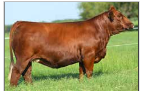
HOC DREAM TIARA 131D $33,000 DAUGHTER OF LOT 2 AND DAM OF LOT 2A

Tiara 131Z was campaigned by the Berry family early in her show career. This mating generated a lot of interest and competitiveness in it's youth. A full sister, employed now by Red River, brought a significant amount in the Circle M Dispersal and had an awesome track record of producing sale topping, back drop achieving stock. This red baldy produced a 2018 Black Label high selling feature bred heifer to the tune of $33,000 a year ago. Bird Cattle Co won the race. Embryos from this female averaged over $1,000 a piece in the 2019 Cowtown Classic. This female sells open and ready to generate genetics and income.