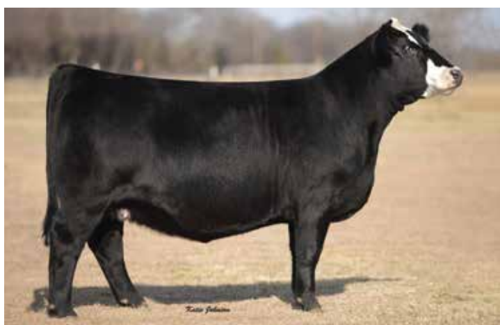
SWC HOC ANNIE K 165C