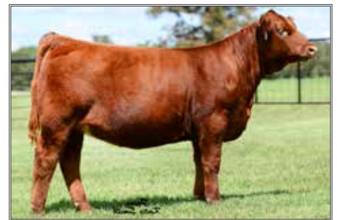
CMFM KNOCKOUT 035C AS A CALF DAM OF LOT 56 & 57