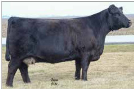
WLE MISSY U409 DAM OF LOT 19 & 20