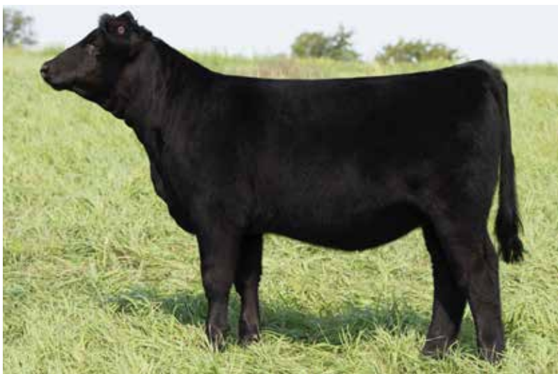
BAR O GEMMA 916G OFFERED BY BAR O CATTLE COMPANY