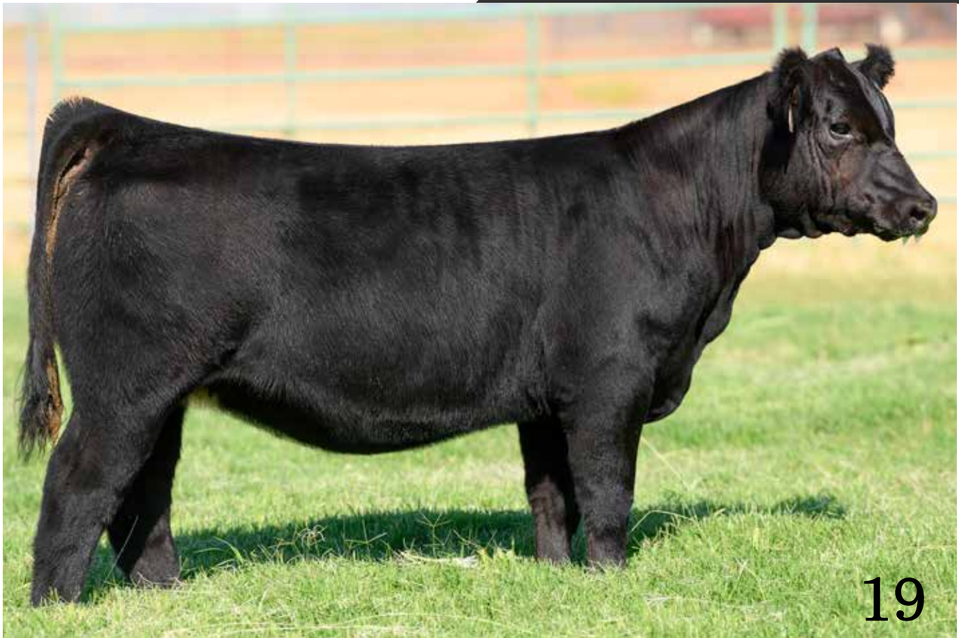
JCBB MISSY G9382 OFFERED BY BIRD CATTLE COMPANY