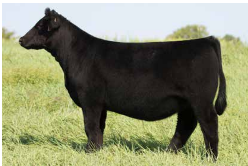
BAR O GUCCI 915G OFFERED BY BAR O CATTLE COMPANY

The influence of MR HOC Broker has left a lasting impression on the business. In fact, Broker has been a household name for years because of the dominance his progeny have had in the show ring, sale ring, and in production. This duo are direct daughters of arguably the best full sister to Broker in existence, SWC M2C Zereasa 825Z. They are sired by CCLT Alliance, a past sale highlight at Hartman Cattle Company that commanded $70,000. Alliance is now a member of the elite herd sire battery at Wheatland Cattle Company of Saskatchewan, Canada. These females represent the type and kind of cattle that Bar O Cattle Company has become known to produce. From the ground up they are genuine in their foot design, correct in their angles, and flexible on the move. 915F is the older of the pair and one that we have admired from day one due to her added confidence and poised look of quality. 916F is the natural calf of 825Z and resembles her big sisters outline with an added shot of body depth and mass. These two sisters will be competitive on a leather lead, but at the end of the day the quality and cow family will remain, and they'll always be out of the legendary Broker's full sister!