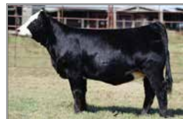
JSSC CAROLINA 631D DAUGHTER OWNED BY MCKINZIE TURNER