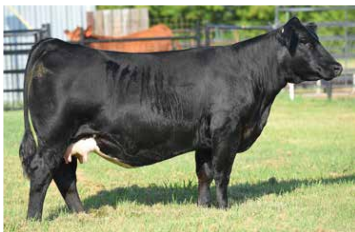
SWC HOC ANNIE K 214C