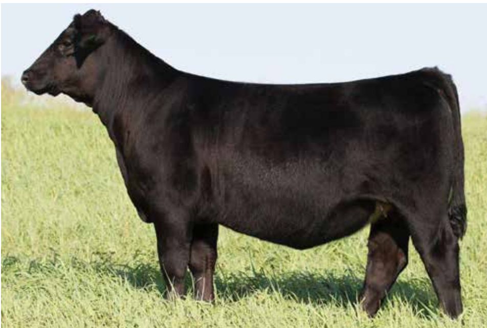
KCC1 SWC GIRL CRUSH 828G OFFERED BY SHIPWRECK CATTLE / KEARNS CATTLE