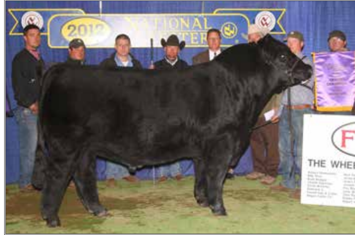
FBFS WHEEL MAN 649W SIRE OF LOT 76 & 77

The dam of 743E may be one of my all time favorite Simmental donors. Lucky Dice, Power Drive, and the great Queen Mother cow family makes her as old pedigreed as H25 but with more notability. She was so stout and massive in her kind and always produced the right kind for the times. This daughter of Wheel Man will not disappoint as she blends the power of her dam with the length, extension, and look of her sire. PE 7/1/19 - 8/15/19 to JSSC ANCHOR 774E. Checked safe.