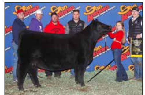
RUBY SWC WICKED E756 $15,000 MATERNAL SISTER