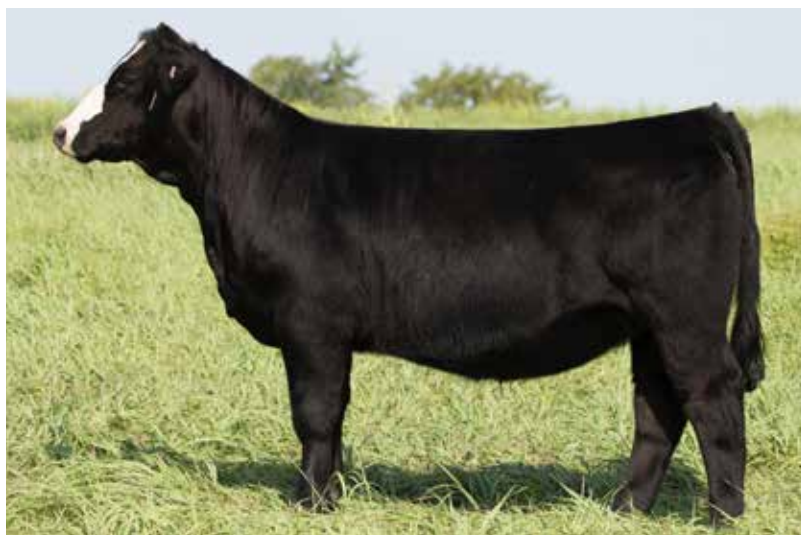
BAR O GIANI 914G OFFERED BY BAR O CATTLE COMPANY

Bar O Giana 914G is the result of a proven and predictable mating that is backed by the influence of SWC M2C Zereasa 825Z, the full sister to the Triple Crown winner, MR HOC Broker. 914G is the stoutest and most three-dimensional of the 825Z daughters that will be selling in Grandview, Texas this fall and we are confident that she will follow in the footsteps of her donor dam when her show career is over. A full sister sold in the 2018 Black Label Event and was selected by the progressive Swain Select Simmental program of Kentucky. 914F is the lone baldy female out of 825Z in this year's offering, and we believe that her added stoutness of foot, bone, and shape will aid in her ability as a producer when her career on the road comes to a close. Study the cow family, consistency, and generating potential that these 825Z daughters are capable of offering!