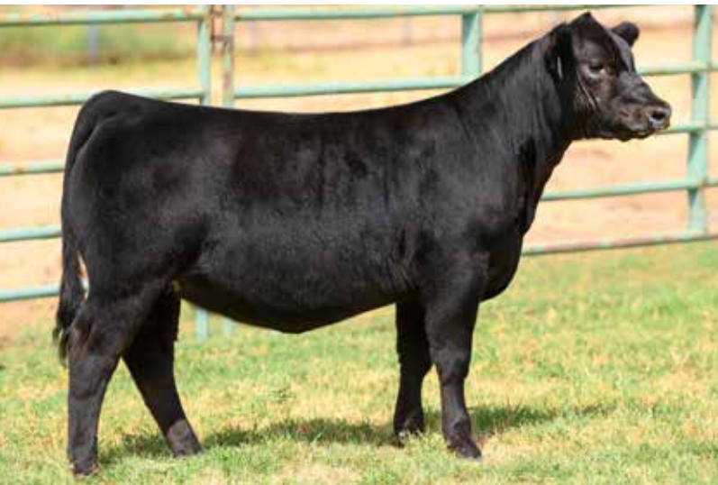
JCBB MS EMBLAZON G918 OFFERED BY BIRD CATTLE COMPANY