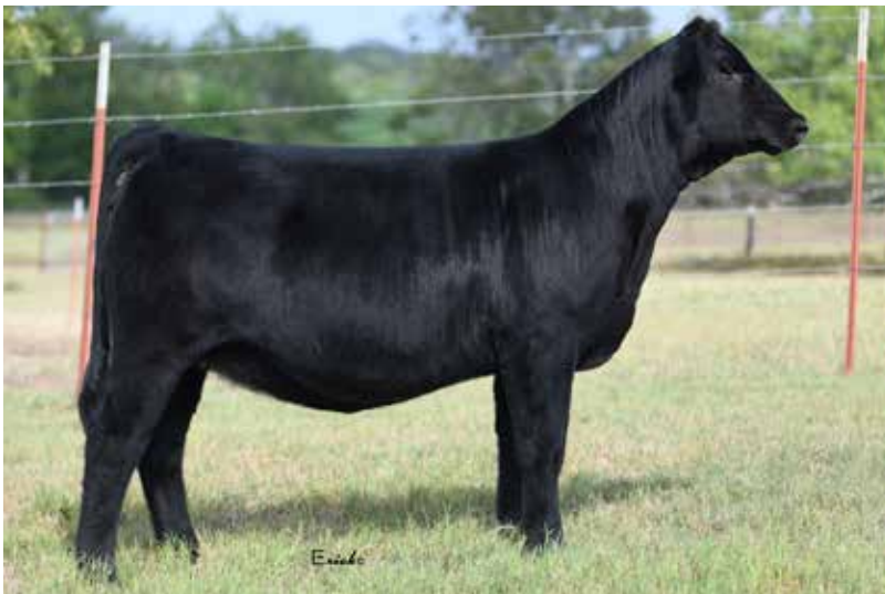
SJCC GLITTER & GOLD G018 OFFERED BY SOUTHERN JEWEL CATTLE COMPANY

If you have ever wanted to be the first to have industry changing, elite genetics, here is your shot. SJCC Grace Kelly is the direct daughter of our newest, hottest herd sire, SJCC Darwin D017. Since his full sister SJCC Daddy's Girl D014 was Supreme Champion at San Antonio in 2018, the hard work is already done. The sleek lines, expressive hip and crazy front third are just the beginning. If you like her now, you will love her next year.