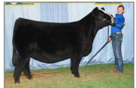
KCC1 HAVANA 83E DAM OF LOT 13