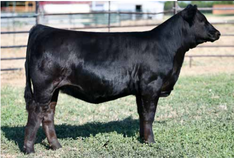
FBFS GIRLY GIRL 902G OFFERED BY FOSTER BROS. FARMS

Years ago, we offered a female that was acquired by Owen Brothers. FBFS Wakanda, a daughter by Ever Ready from the S600 brood matron, went on to produce multiple high sellers and sale highlights during her tenure, but one most notable would be the multi herd herdsire, Blacklist. Blacklist is by the undefeated Pays to Believe and offers length, balance, and look to his progeny. So, there's little left to question about the future of this young female when we include the fact that she is out of a National Champion and linebred S600 cow family. The pedigree blended with her pen presence earns her the right to have the leather, but her value after the tan bark would be significant moving forward in any program. The FBF cattle are Super Bowl eligible, and they would like to retain 12 embryos at the buyer's convenience and FBF's expense within the first 3 years of production. This female is entered in the NAILE.