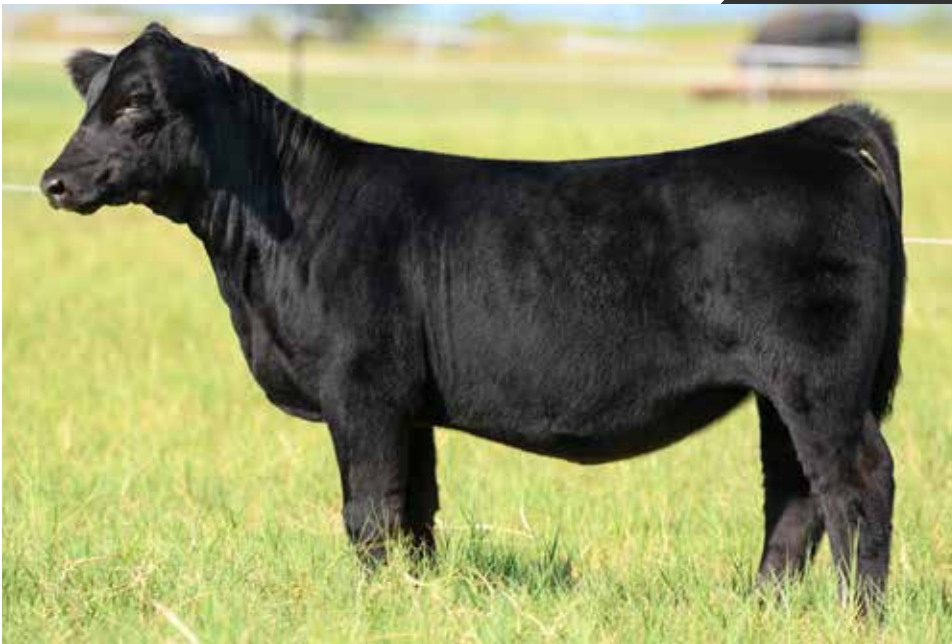
NFFS GISELLE 022G OFFERED BY SHIPWRECK CATTLE / NIXON FAMILY FARMS