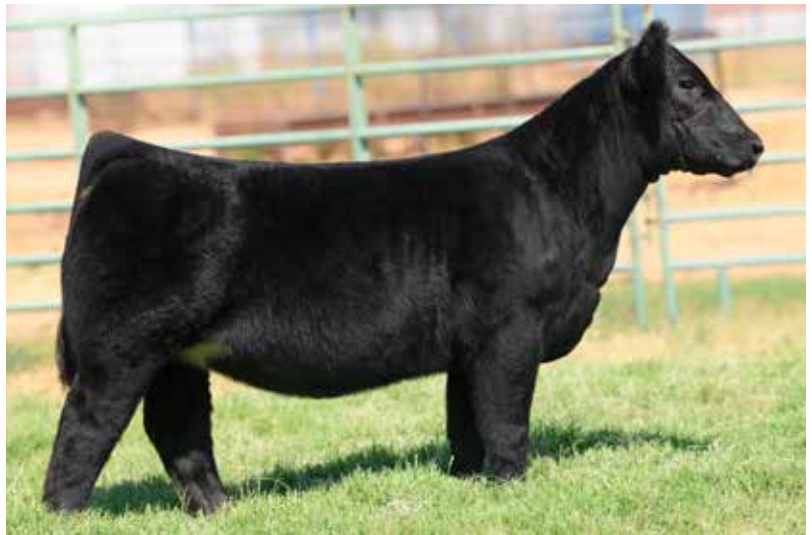
JCBB GEORGIA G9404 OFFERED BY BIRD CATTLE COMPANY

JCBB Georgia G9404 is another Dinero female that backed by an I-80 bred dam. She has been blessed with the added hair, stoutness, and extension. A dual registered half-blood Simmental and Maintainer female that will be a fun one to campaign during the show season because the added look and captivating profile that she possesses!