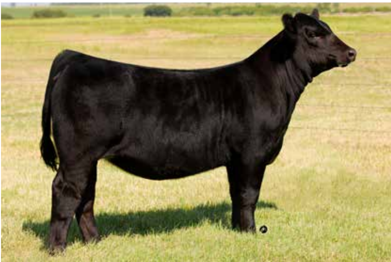
RGRS/WLTR ELINOR 8G OFFERED BY WALTER CATTLE COMPANY