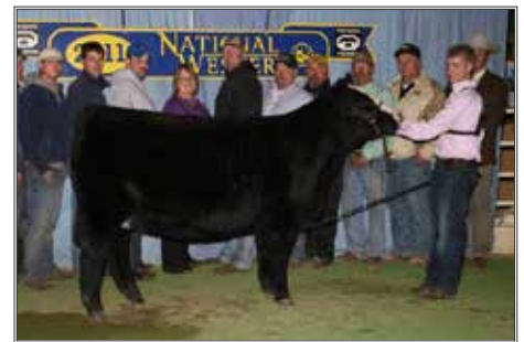
KLS DIAMOND W516 2011 NWSS GRAND CHAMPION FEMALE & MATERNAL GRANDDAM