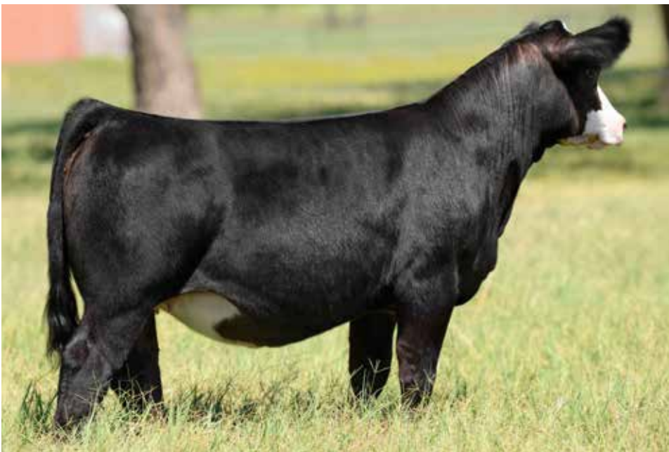
SWC GRETA 702G OFFERED BY SHIPWRECK CATTLE