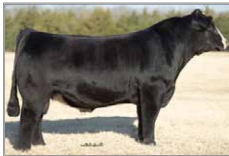
SVF STEEL FORCE S701 SIRE OF LOT 58

The importance of cow families in this business cannot be overstated. With that thought in mind, we encourage you to study this gem!! Her maternal Granddam was a foundation Angus female in our program by Northern Improvement. She gathered her share of hardware in the showing, but more importantly, established herself as a leading Angus matron here at Walter Cattle Company. This Steel Force female has all the parts and pieces to follow in the same path as her Dam and Granddam, and blaze a new trail both on the tanbark, and in production. This female has been a standout since birth, and looks to have an extremely bright future. Her structural integrity is complimented by her intriguing silhouette. This is the kind to tie to and hold on for the ride!!!!!!