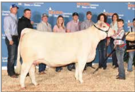
LJR MS TIGER LILLY 2041C DAM OF LOT 70 & 71 2017 SALE GRAND CHAMPION CHAROLAIS FEMALE 2017 HLSR GRAND CHAMPION CHAROLAIS FEMALE

This pair of flush sisters are from the Tiger Lilly 2041 donor that was never beat at a Texas Major and stood Reserve Division at the Charolais National Show in Ft. Worth to the National Champion Female. The Outkast sire group has been admired nationwide and this flush was simply awesome. This pair slightly differs in kind by from a shape and dimension standpoint, we think they are similar. Both have great dispositions and bright futures, we will let you sort them on October 12!