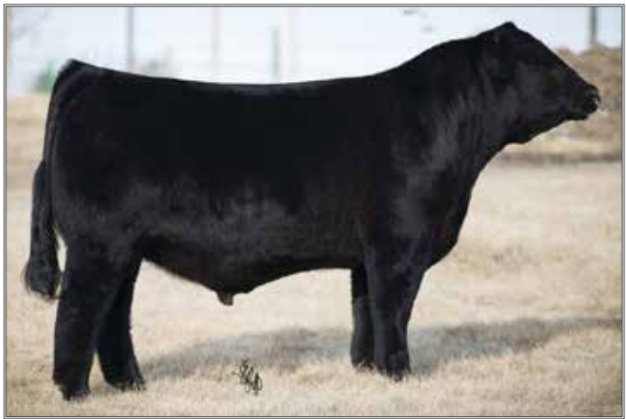
RUBY SWC BATTLE CRY 431B SIRE OF LOT 15-17

Here is another Battle Cry sired female that is backed by the Limestone Star W992 donor from the potent Star cow line. She is a maternal sister to several top percentage herd bull prospects that were members of a class winning pen of three percentage bulls at the 2019 NWSS. This female is equipped with the stoutness, style, and look to follow in the footsteps of her lineage!