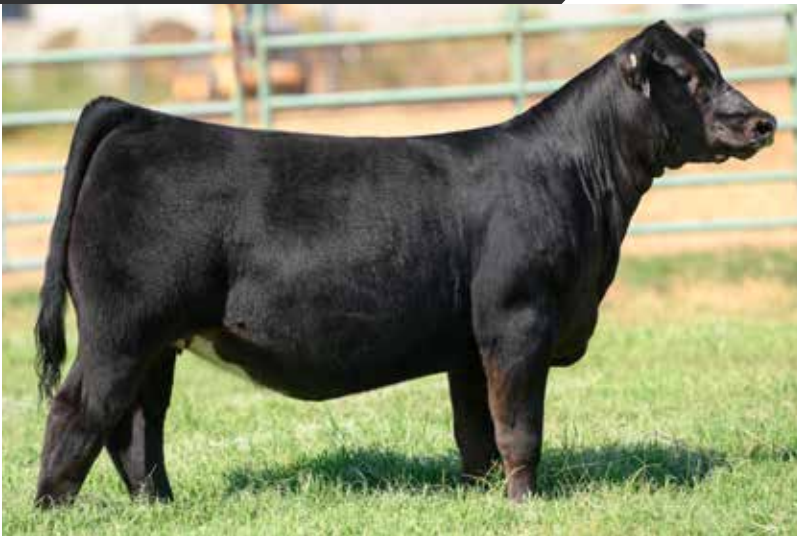
JCBB MS EMBLAZON G9112 OFFERED BY BIRD CATTLE COMPANY