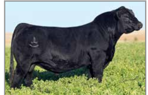
KCC1 EXCLUSIVE SIRE OF LOTS 10-12, & FLUSH MATE BROTHER TO THE DAM OF LOT 13