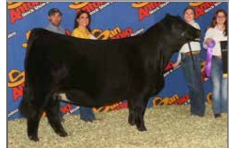
2019 SALE GRAND CHAMPION FEMALE DAUGHTER OF FBFS X-CLAMATION 76X