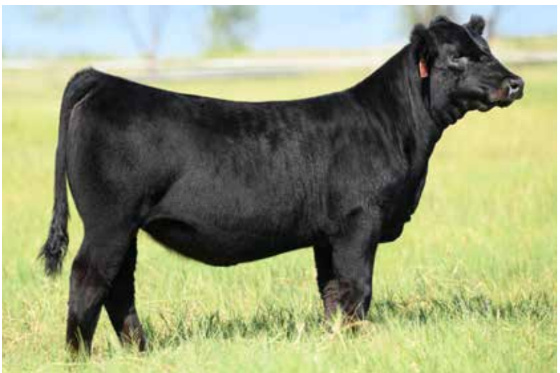
NFFS GEORGIA 016G OFFERED BY SHIPWRECK CATTLE / NIXON FAMILY FARMS