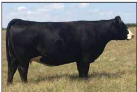
WLTR FLO 2A ET DAM OF LOT 40

The success of the Relentless progeny is undeniable. He has worked in countless programs throughout the country, and his utilization at Walter Cattle Company has proven positive as well. Just this summer, a Relentless daughter carrying the WLTR prefix was Reserve Grand Champion Purebred at the TJSSA Summer Classic for the Sulak family. This after being undefeated in class at all the majors in the Spring of 2019 and Res Division Champ at Houston! We feel that this female is cut from the same mold. Extremely elegant in her build with structural integrity and mobility, this female has the look to be highly successful. We look forward to watching this one's future!!!!