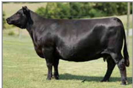
CBAR BD SARA 927W DAM OF LOT 10 & 11