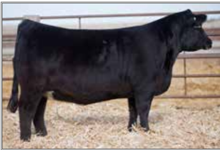
DUELLO BROKERS LUCY 4114 DAM OF LOT 49 & 50