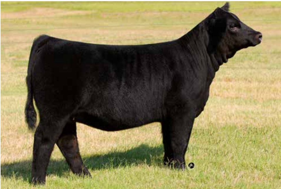
WLTR LAYLA 6G OFFERED BY WALTER CATTLE COMPANY

Sired by Nashville, a previous sale topper in a Spring edition of this very event, this female certainly has her place as we strive to continue bringing high quality to Grandview for your appraisal. This Purebred female is unique in her ability to combine the attributes that can push a program forward. This April female is young, but study her structure, her look, and her overall quality. Nashville has sired countless sale toppers and banner gathering progeny, and this one is no different.