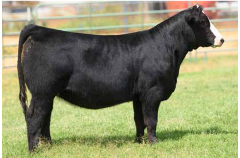
JCBB GLORIA G933 OFFERED BY BIRD CATTLE COMPANY

JCBB Gloria G933 is a prime example of what can be produced when stout Simmental sires are mated to productive Angus females. G933 will be a competitive SimAngus female that will be entered in ORB shows at the Texas Majors. We anticipate this April born female to be successful for her new owner as a competitive jackpot heifer that will mature into a powerful bred by the 2021 show season to make a hard run from Fort Worth through Houston!