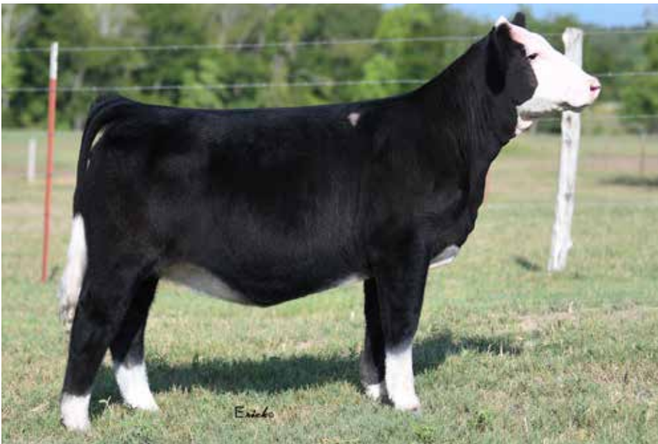
SJCC GYPSY ROSE G010 OFFERED BY SOUTHERN JEWEL CATTLE COMPANY

One of the best things about this heifer is her free, look at me, bonus color. In this scenario, the color draws your attention every time you walk by as it will a judge in the showing. And much the same way a judge will do, each time you look at her, you realize how much you like the way this one is built. Sharp and crisp in the way she is designed, great running gear and the rib shape we all look for are just the tip of the iceberg on this, frosted, heifer. As the first female out of our young SJCC Amethyst C026 donor, she shows us a promising future with quality sure to shine though in any scenario.