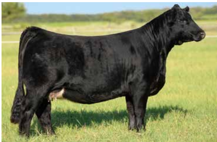
HWGW ELLA E53-B26