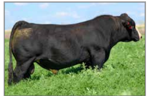
JCBB CASH MONEY SIRE OF LOT 62-64

JCBB Gretchen G9586 is a Cash Money daughter that is backed by a female bred in the Cardinal program at Wyoming, Illinois. Her dam is a percentage female that offers tremendous body depth, stoutness, and eye-appeal. This 3/4-blood female is another March option to be competitive at the forefront of your class in the ultra competitive ORB show at the Texas Majors!