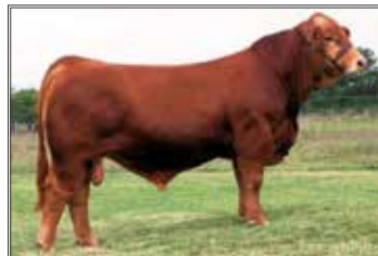
LN LMC 12TH MAN Y238 SIRE OF LOT 45A