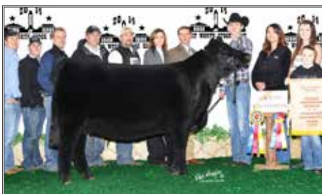
W/C MISS ANGEL 2870Z DAM OF LOT 21 & 22 FWSS GRAND CHAMPION

at this stage. The front third is extreme and out there, but the correct pieces fall in place from there back. She's the green, skinny one that most would call the sleeper, but the pedigree, the numbers, and the unique factor should attract even the most discriminating breeders and bidders. The Utah and Relentless mating have been done over and over again on this donor dam with consistent results. 98G will be one to view and analyze come sale day. Pedigree is no secret and again a green one with a ton of promise. When one gets back off and studies her shape, kind, and skeletal orientation, the pieces fit, and they will come together in time. Great attitude and disposition, she is first year exhibitor acceptable!