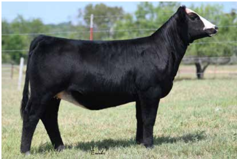
SJCC GRACE KELLY G015 OFFERED BY SOUTHERN JEWEL CATTLE COMPANY