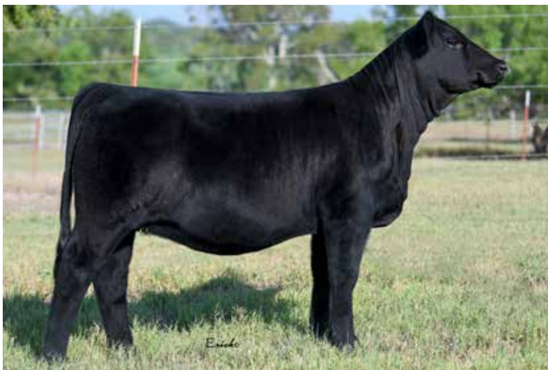
SJCC GRETCHEN G026 OFFERED BY SOUTHERN JEWEL CATTLE COMPANY