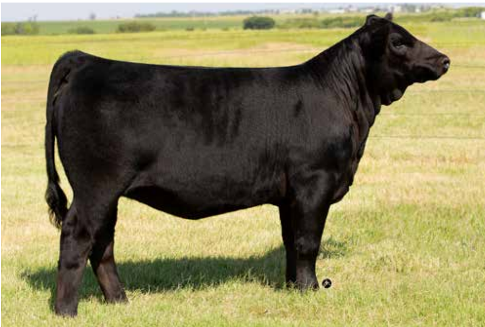
WLTR LORETTA 2G OFFERED BY WALTER CATTLE COMPANY

A maternal sib to WLTR Two Steps Ahead 27C, the highly competitive sire owned by Sublette Cattle Co, who gathered his share of banners including Grand Champion Purebred Bull at the 2017 Ft Worth Stock Show. This female screams COW POWER!!! Her extra punch and power is accompanied by an abundance of center rib and overall performance. With all that, this female still maintains a very maternal look with plenty of symmetry and presence for the tanbark. This is the type and kind of female that will keep you in the business. This one has the potential to lay down and have the next high caliber herd sire, after all, it runs in the family!!