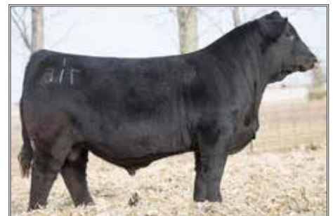
RUBYS TURNPIKE 771E SIRE OF LOT 24