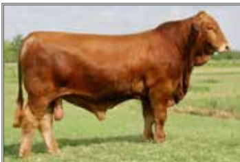
LN LMC DREAM UP W219 SIRE OF LOT 43 & 44

OFFERED BY SEALE SHOW CATTLE / LA MUNECA