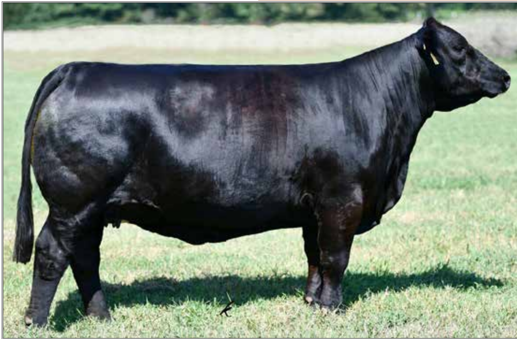
LMC DAYDREAM 5Z/173 DAM OF LOT 43-45C