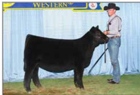
SWC RUBY WICKED FRAN $30,000 MATERNAL SISTER