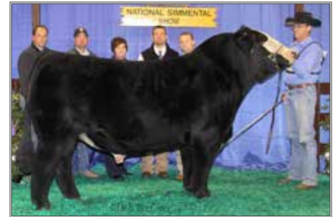
MR HOC BROKER TRIPLE CROWN WINNING MATERNAL BROTHER TO LOT 72

One could easily state that is linebred H25 as it is fact. United is from one of the best and fundamentally superior cow families in the entire Werning program other than 8543. His cattle, especially bull progeny, have continued to be in demand every February in Emery, SD and nationwide throughout the breed during bull season. So why wouldn't it be possible that 056A would be around for many more years to come? The one thing that can positively be said about 056A is that she has definitely been underutilized here at FBF and we are confident that we have not tapped into this female's true potential due to several circumstances and management changes while she has resided in Lockney.