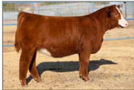
JCBB MISSY E3856 FULL SISTER THAT IS OWNED BY RUST MOUNTAIN VIEW RANCH

JCBB Missy G978 and JCBB Missy 9382 are the result of one of the most successful mating that has ever been created at Bird Cattle Company. In past Black Label events, the U409 daughters have always been sale features, which include the $19,000 red baldy female that was selected by the Rust Mountain View program of Mercer, North Dakota. U409 topped the NAILE Select sale as the $47,000 featured donor dam from the Horstman Cattle Company program of Indiana. There have been countless high sellers, herd sire prospects, and now donors that have been progeny of the legendary Missy U409 matron. Here is your opportunity to invest in a Missy U409 daughter by the tried and true DMCC Counter Attack!