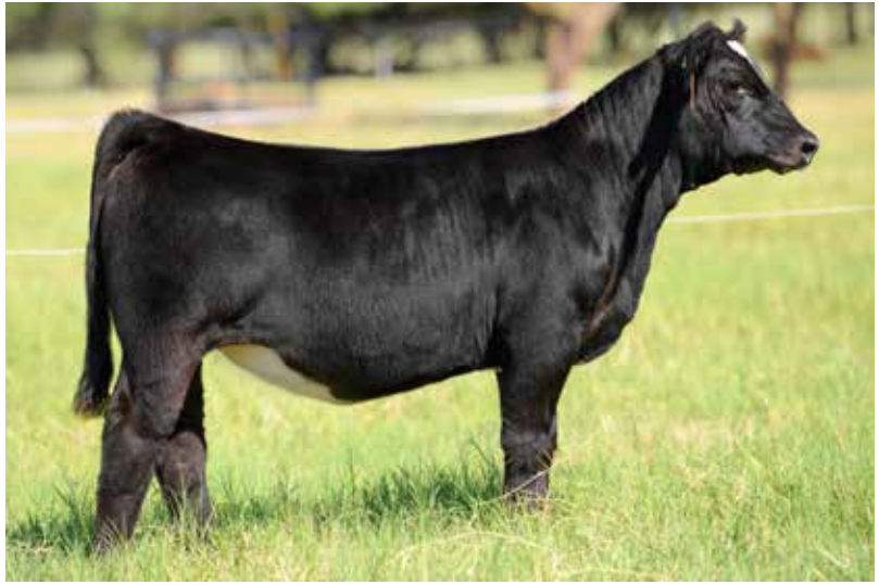
NFFS GRACE 007G OFFERED BY SHIPWRECK CATTLE / NIXON FAMILY FARMS

Here is a pair of flush mate sisters that are sired by the popular Broker son known as Battle Cry. The dam of these flush sisters was bred by Fenton Farms of Oklahoma and was purchased by the Nixon family via Hilmes Show Cattle. Grace and Georgia are Purebred females that are backed by a granddaughter of the legendary SOSF Ebony's Joy L-123 matron that is sired by a Built Right son. Grace 007G is the white flanked March sister that is stout, massive centered, wide based, big legged, and offers that brood cow look with the shot of style and class needed to be noticed. The April sister, 016G is the smoother, elegant fronted, clean chested, big bellied female that is understandably a bit greener in her condition, but one that we love the futuristic look that she offers. Regardless of which one of these females you prefer to lead, rest assured that the quality of build and cow family will never tarnish!