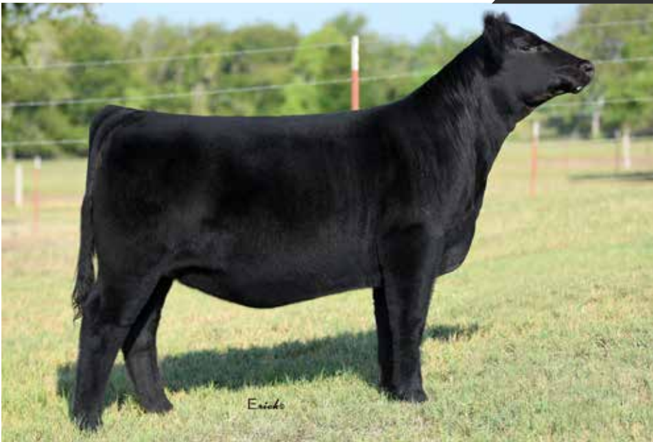
SJCC GODIVA G002 OFFERED BY SOUTHERN JEWEL CATTLE COMPANY

It is not very often that a donor out performs raising calves than the recipis. It is a testament to the strength and quality not only on a physical plane, but also to the genetic performance packed to this natural calf from our prolific CSCX Diamond 472Z cow family. SJCC Godiva G002 is a heifer that you can truly find yourself indulging into. This high performing heifer brings power, depth, structural integrity and femininity to the next level. This one has all you look for in a female plus all the extras we hope for.