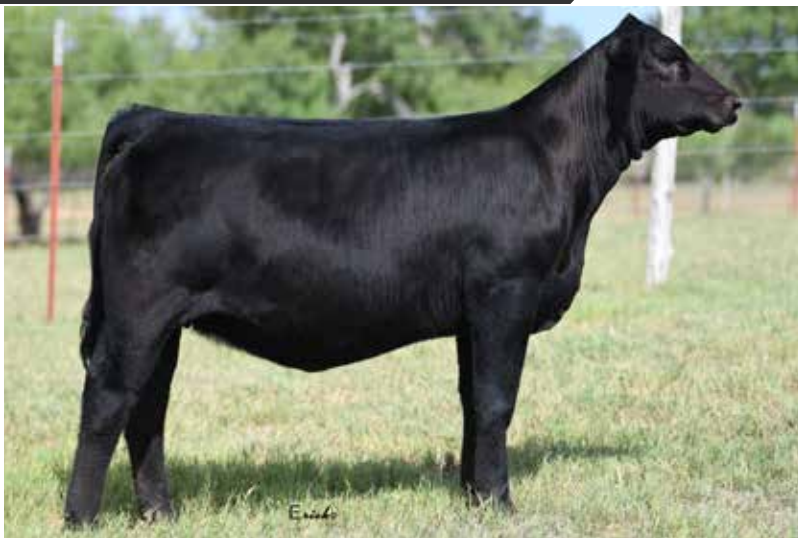
SJCC GIRLFRIEND G029 OFFERED BY SOUTHERN JEWEL CATTLE COMPANY