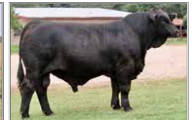
LMC MT TRANSFORMER 5E/32 SIRE OF LOT 45C