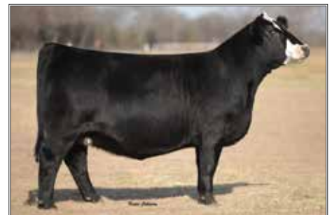
SWC HOC ANNIE K 165C MATERNAL SISTER TO DAM OF LOTS 46 AND 47 DONOR DAM OF LOT 48