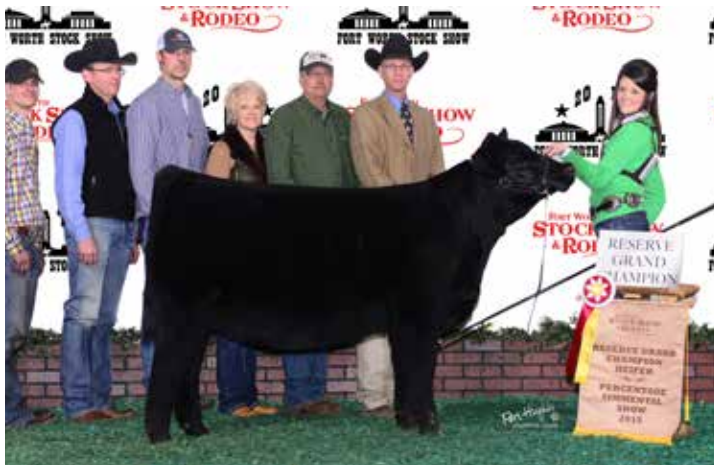
2015 FT WORTH STOCK SHOW RESERVE GRAND CHAMPION % FEMALE MATERNAL SISTER TO SWC HSC CANEY 054C