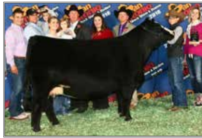
SJCC DADDY'S GIRL D014 DAM OF EMBRYOS & FULL SISTER TO THE SIRE OF LOTS 35 & 36

OFFERED BY SOUTHERN JEWEL CATTLE COMPANY / KAYDEN TANNER