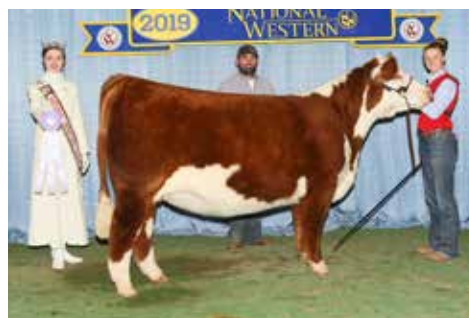
MAKAYLA LUCKIE RESERVE DIVISION CHAMPION 2019 NATIONAL WESTERN STOCK SHOW