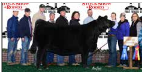
JSSC CAROLINA 004C 2017 FWSS GRAND CHAMPION PB SIMMENTAL FEMALE

Where do we start with this great female? You can talk about the fact she combines two of the great families in the Ebony Antoinette and H25. Next, one might notice the female's phenotype she possesses. Not to mention the outcross pedigree. Absolutely no Dream On, Lock & Load, or any of the popular sires of today are related. So the mating possibilities are endless. Finally, we look at actual production and this is where she truly shines above all others. She has an Average of $19,500 on 5 head through this very event and $4,250 average on her bull progeny, with two being retained for in herd use. This female has truly been a blessing for the Seamans Cattle Co. and My Family. It is with great hesitation that we offer her, but we always feel like we must offer our best! AI bred on 8/8/19 to the great Profit.