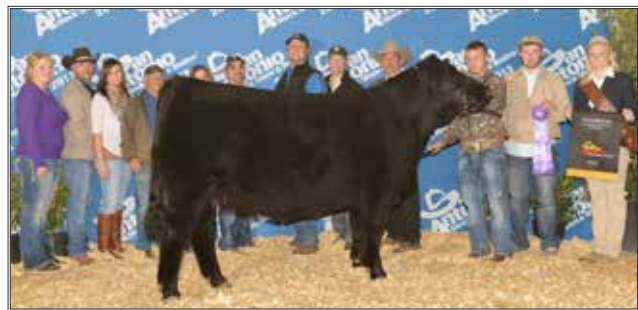
JSSC YOVELLA 032Y DAM OF LOT 3