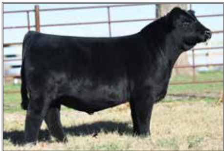
OBCC CMFM DEPLORABULL D148 SIRE OF LOT 6