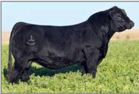
KCC1 EXCLUSIVE 116E SIRE OF LOT 49 & 50

JCBB Lady Gaga G9453 and JCBB Lady Grace G990 are two 3/4-blood females that we think a lot of. They are sired by the $120,000 KCC1 Exclusive and backed by the Western Elite $38,000 1/2 interest sale topping female, Duello Brokers Lucy 4114. 4114 has emerged as one of the elite percentage donors in the Bird Cattle Company program, and is backed by a powerful Angus female that was successfully campaigned by the Ward Brothers of Missouri. 4114 is simply flawless in her basic built and organization of skeleton. This mating to Exclusive yielded one of the best heifer calves to ever come to the weaning pen at Bird Cattle Company, in JCBB Lady Gaga G9453. There is no denying the stoutness of bone work, elegant look, massive rib design, and captivating symmetry that she offers. G990 certainly doesn't disappoint either from a fundamental perspective, she too is a stout constructed, square made, ultra attractive high percentage SimAngus female. The matrons that line the pedigrees of these two flush sisters is second to none and we think you'll appreciate the quality and consistency of the 4114 daughters on sale day!