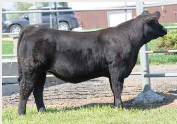
HARMS KIMMY / Lot 6

Offered by Harms Farms HARMS KIMMY is a unique individual with tremendous base width, squareness, and muscle expression that further enhances her balanced number profile. She is huge footed, stout boned, big hipped with tremendous pin width! Just imagine the mating options that this three-dimensional brood cow prospect possesses. We anticipate this female to excel from a bull production standpoint, while still serving as a foundation to build a female base around.