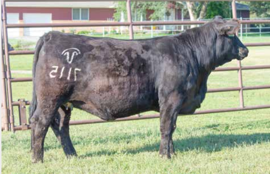
HANELS MISS AXIS E7115 / Lot 36

HANELS AXIS A3012 has been a mainstay senior herd sire in Courtland, Kansas and used with exceptional success. The cattle come easy, grow rapidly, and excel in production. Our valued bull customers appreciate the spread value that the Axis sons have added to their operations through lower birth weights and more impressive weaning weights when they market their steer calves. There is tremendous potential in these Axis females when it comes to making highly productive, revenue deriving brood cows that excel in different environments. They are once again ALL safe AI to leading calving ease specialists, including Dividend, Big Timber, Boulder, and Legendary! These six daughters of AXIS will be a quick return on investment. Buy with confidence here, another product of the program!