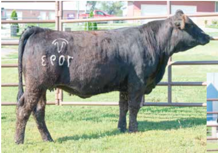
HANELS MISS OLIE E7093 / Lot 49