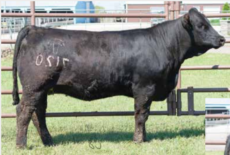
HANELS MISS AXIS E7120 / Lot 39