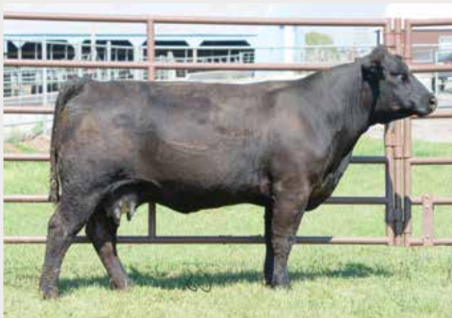
HANELS MISS HOOVER C5053 / Lot 11