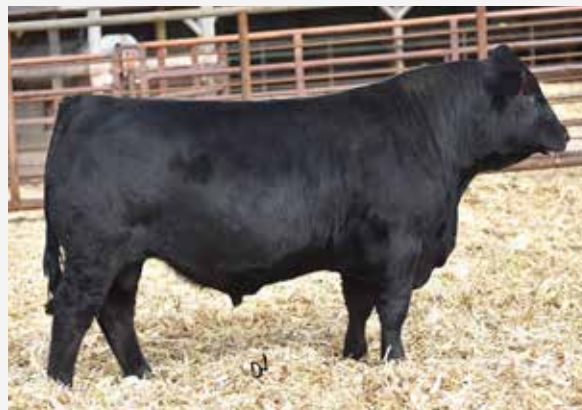
HOOK'S BEACON 56B / Sire of Lots 18 - 22.

Hook's Beacon 56B is the #2 API and the #1 TI Purebred Simmental bull in the entire breed! Hook's Beacon 56B is simply the highest dollar value Homo. Polled/Homo Black Purebred Simmental bull to have been produced in the entire Simmental breed to date. Generating $API 185.6, $TI 97 in a 6 frame package with added length, substance and muscle, Beacon is a true outlier in every sense of the word. These females chart with elite number profiles, superior growth and tremendous calving ease. They are sound built, long sided cattle that excel from a carcass merit standpoint and still offer the practicality that we demand from our cowherd. Look to these females to add the impact of the great Beacon to your genetic base!