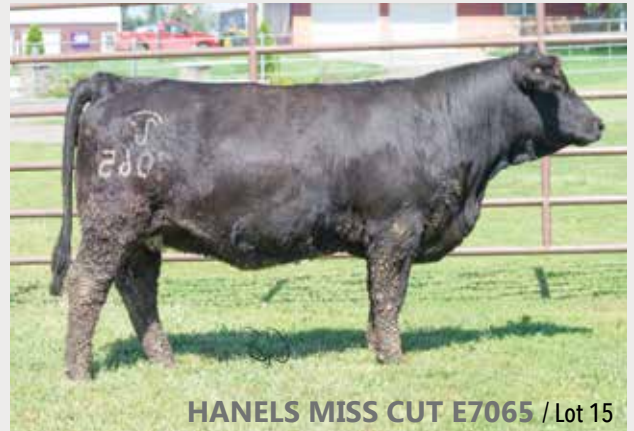
HANELS MISS CUT E7065 / Lot 15

AI BRED 4/23/18 TO CONNEALY LEGENDARY 644L (AAA: 18534952). ESTIMATED DUE DATE 1/31/19