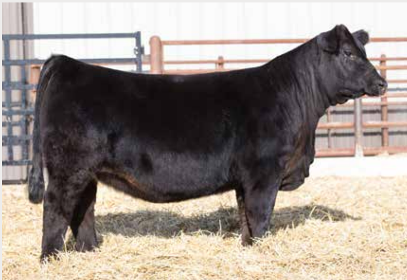
CLRS EMOJI 703E / Donor of Lot 5 embryos

It's no secret; we went all in when it came to using RUBYS TURNPIKE 771E, the $71,000 stud that was a highlight among the Simmental's bull line-up this past Spring. CLRS EMOJI 703E is the breathtaking female that we selected as an open female from Clear Springs Cattle Company for a $10,000 hammer price. Her body mass, three-dimensional body shape, overall width and squareness makes her an exciting breeding piece as we continue to assemble breed-leading females in our donor arsenal. A cutting edge mating that we are anxious to see results from! Offering 3 grade 1 conventional embryos. Guaranteeing 1 pregnancy if implanted by a certified embryologist.