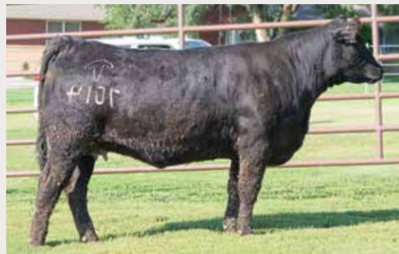
HANELS MISS E7014 / Lot 30

AI BRED 4/5/18 TO CCR BOULDER 1339A (ASA: 2880390). ESTIMATED DUE DATE 1/13/19