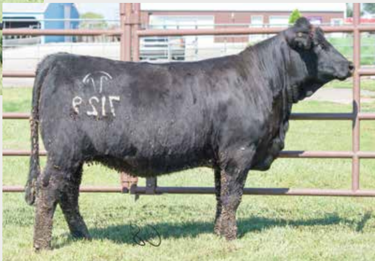
HANELS MISS AXIS E7129 / Lot 41

LOT 39 HANELS MISS AXIS E7120 ASA# 3330987 PB SM Cow DOB: 2/4/2017 Tattoo: E7120