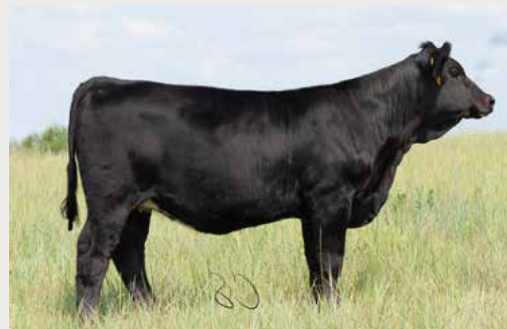
BROOKS MISS FRONTIER F19 / Lot 7

Offered by Brooks Simmentals This is an AI daughter out of an embryo transfer dam. The pedigree goes very deep with stacked AI sires. She is 3 generations deep from the famous donor cow Miss Kansas K11G. 11G is the # 2 cow in the Simmental breed for the number of progeny produced, currently 231 calves. She has produced many donors and numerous bulls including a National Champion.