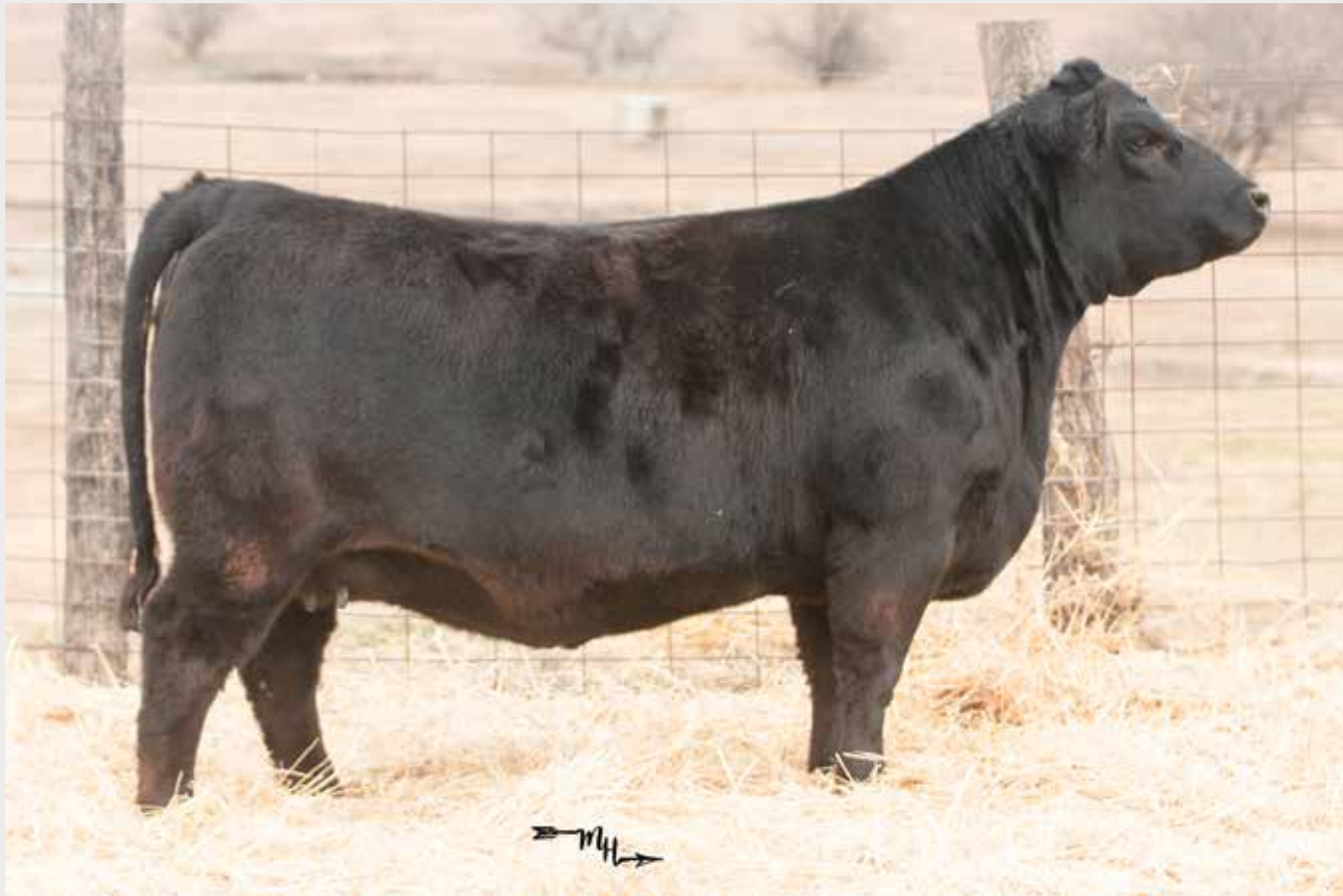
M4 MS CAPITAL GAINS C75 / Donor of Lot 3A & 3B embryos

HOOK'S YELLOWSTONE 97Y KOCH BIG TIMBER 685D KOCH MS HOOKS BOY CONNEALY CAPITALIST 028 M4 MS CAPITAL GAINS C75 SFI BETTY SUE Y85T HOOKS TAURUS 24T HOOKS SHEYENNE 77S GW LUCKY BOY 252U HOOK'S YORK 51Y S A V FINAL ANSWER 0035 PRIDES PITA OF CONANGA 8821 TNT TOP GUN R244 SFI MISS BETTY LOU