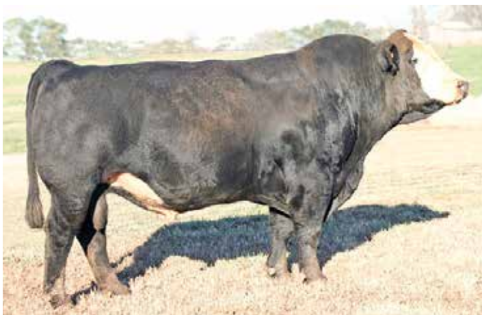
HANELS PALE FACE A3024 / Sire of Lot 52

LOT 52 HANELS MISS PALE E7142 ASA# 3331014 PB SM Cow DOB: 2/15/2017 Tattoo: E7142