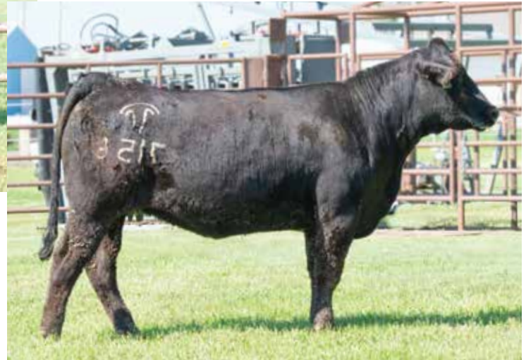
HANELS MISS OLIE E7156 / Lot 51

HANELS DOUBLE DOWN Y1211 DIKEMANS DOUBLE DOWN 26W HANELS DOWN C5067 COTT MANDRA 257M HANELS MISS FOCUS Y1013 MYTTY IN FOCUS S A V FINAL ANSWER 0035 BDV MS LUCKY MAN T37 HANELS MISS ANSWER B4001 SITZ TRAVELER 8180 HANELS MISS OLIE Z2011 S A V EMULOUS 8145 ELLINGSON OLIE W908 HANELS MISS HUMMER X037