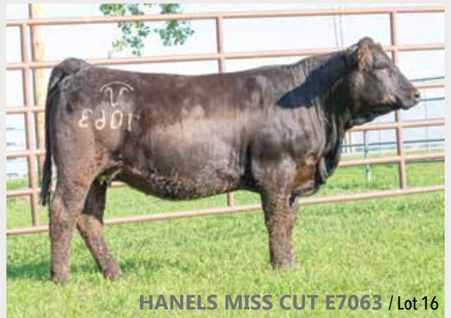
HANELS MISS CUT E7063 / Lot 16

AI BRED 4/23/18 TO CCR BOULDER 1339A (ASA: 2880390). ESTIMATED DUE DATE 1/31/19