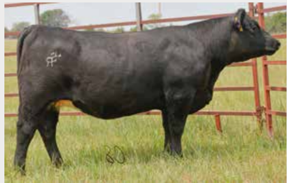
BROOKS MISS UNITED E97 / Lot 26

Offered by Brooks Simmentals Here is a very attractive heifer with the influence of W/C United and PVF Insight backing her genetic make-up. This heifer has at least 4 generations of donors behind her on the maternal side including Miss Kansas K11G. PE 5/1/18-6/6/18 TO R W BRUISER AMBUSH 1475 (ASA: 3153324). OBSERVED NATURAL SERVICE 5/2/18. ESTIMATED DUE DATE 2/8/19.