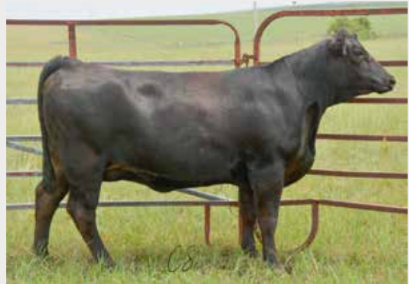
BROOKS MISS TEN E73 / Lot 25

LOT 25 BROOKS MISS TEN E73 ASA# 3290999 5/8 SM 3/8 AN Cow DOB: 1/10/2017 Tattoo: E73