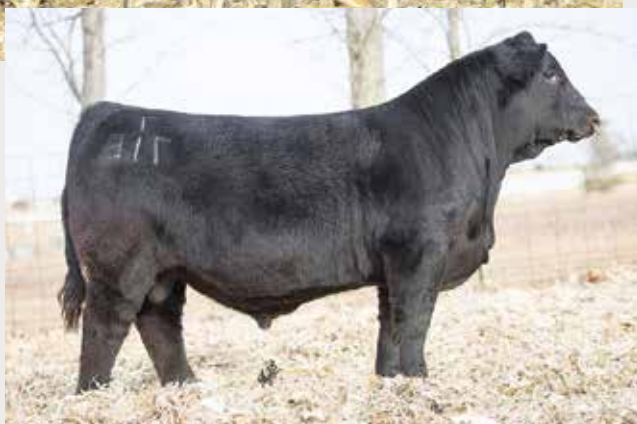
RUBY'S TURNPIKE 771E / Sire of Lot 1A embryos

Offering 3 grade 1 conventional embryos. Guaranteeing 1 pregnancy if implanted by a certified embryologist.