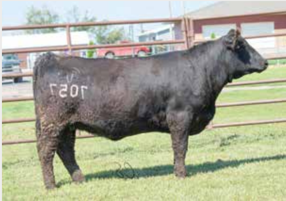
HANELS MISS BROAD E7057 / Lot 23

LOT 23 HANELS MISS BROAD E7057 ASA# 3330972 3/4 SM 1/4 AN Cow DOB: 1/12/2017 Tattoo: E7057