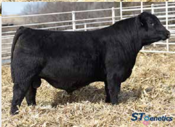
TJ NORTHWARD / Son of Lot 1 and maternal sib to Lot 1A.