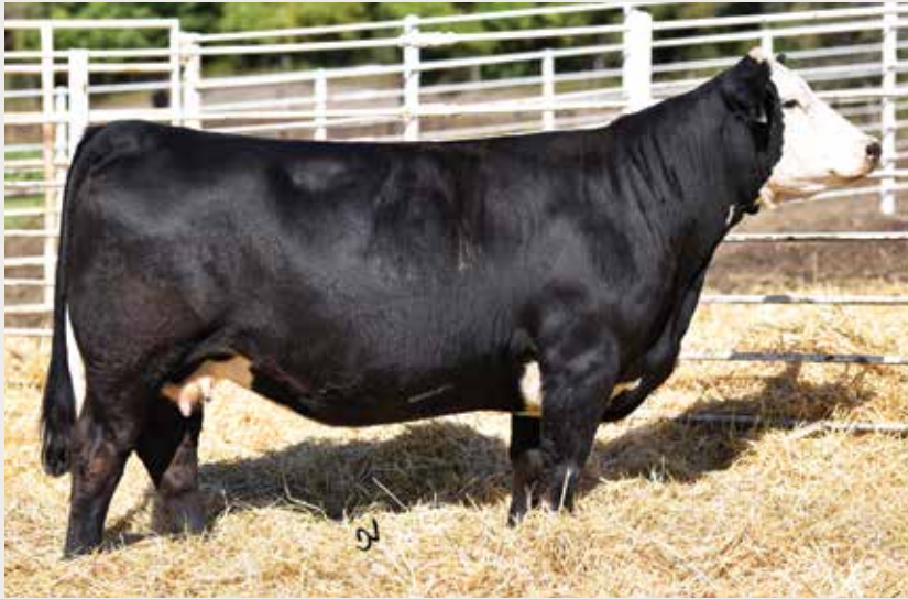
TJ 41Z / Donor of Lot 4A & 4B embryos.