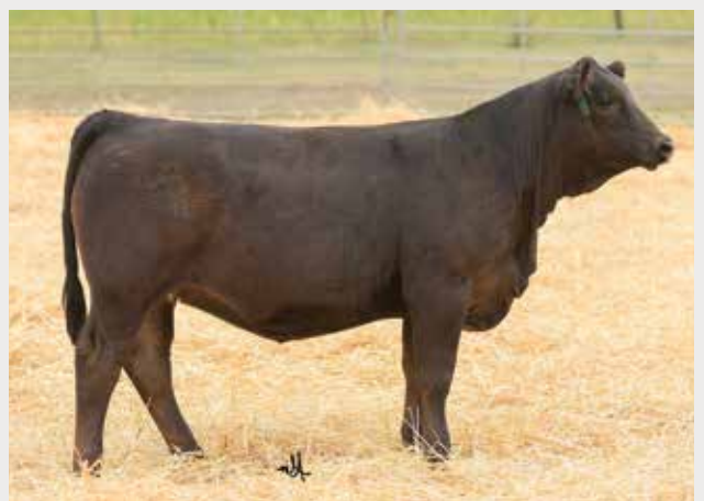
HANELS MISS COWBOY E7034 / 3/4 sister to Lot 16

AI BRED 4/16/18 TO CONNEALY LEGENDARY 644L (AAA: 18534952). ESTIMATED DUE DATE 1/24/19