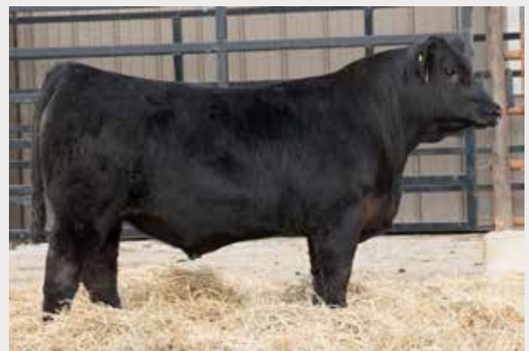
CLRS DIVIDEND 405D / Service sire of Lot 36

AI BRED 4/14/18 TO CLRS DIVIDEND 405D (ASA: 3097854). ESTIMATED DUE DATE 1/22/19