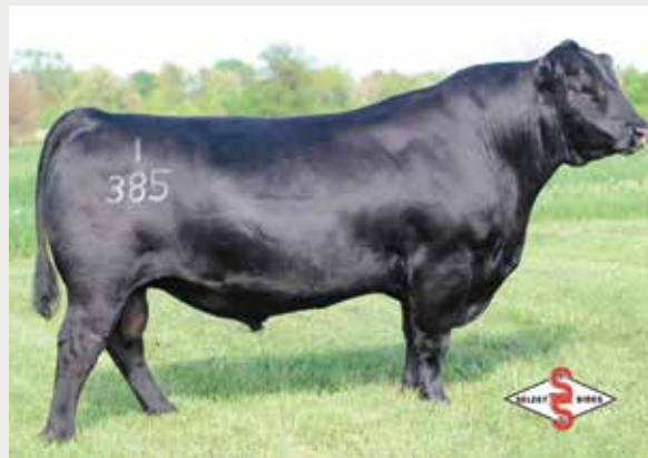
CONNEALY COMRADE 1385 / Sire of Lots 29 & 30.

LOT 29 HANELS MISS COM E7000 ASA# 3331029 3/8 SM 5/8 AN Cow DOB: 1/1/2017 Tattoo: E7000