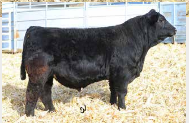
TJ CORNHUSKER / Son of Lot 1 and maternal sib to Lot 1A.