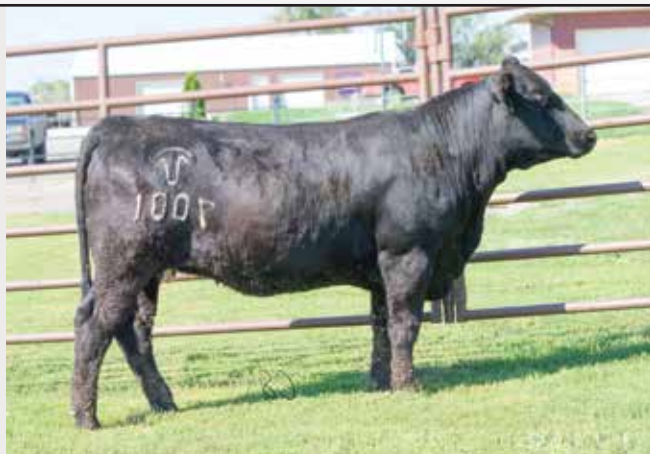
HANELS MISS BEACON E7001 / Lot 18

LOT 18 HANELS MISS BEACON E7001 ASA# 3331011 PB SM Cow DOB: 1/1/2017 Tattoo: E7001