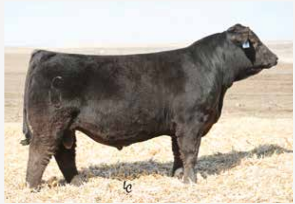
CCR COWBOY CUT 5048Z / Sire of Lot 15, 16 & 17

There is no denying the impact that CCR Cowboy Cut has had on the Simmental breed, and the beef industry as a whole. Elite number profiles, superior performance, exceptional carcass data, and overall phenotypic excellence backs this set of daughters! They are long sided, high performing, wide based, big-topped cattle that excel in all facets of the beef cattle industry! These females will all sell AI bred, a value added approach that not only gains the buyer access to breed leading genetics, but also proves the fertility and longevity of their purchase. These females are the kind that we have built our program around and are sure to enhance the operations that select them as additions on November 5th!