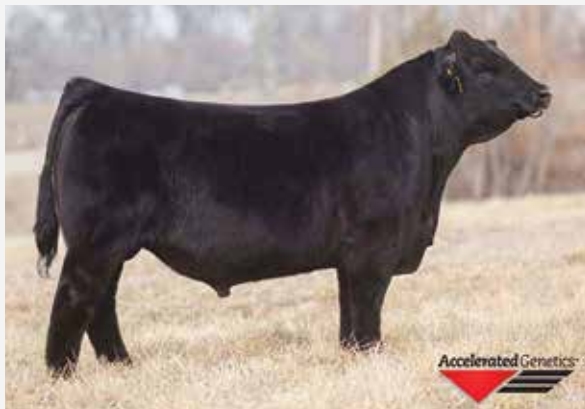
GLS INTEGRATE Z3 / Sire of Lots 31 & 32.

GLS INTEGRATE Z3 MR NLC UPGRADE U8676 ELLINGSON LEGACY M229 MS NLC MOJO S6119 B GLS MISS BTE W149 HSF BETTER THAN EVER GLS/GFTT13 SVF/NJC MO BETTER M217 STF MR MOMENTUM H508 NJC SVF ANTOINETTE K205 HANELS MISS BETTER Z2511 GFI RAMBLER J114 COTT MANDRA 257M KRCC BLACK LADY 104D