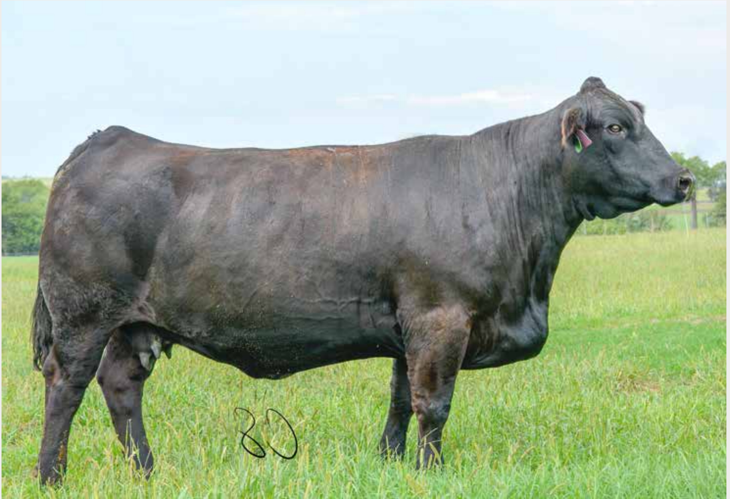
ES X51 / Lot 2