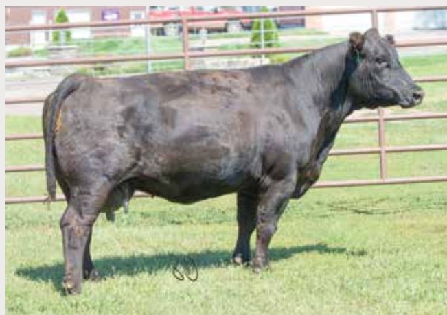
HANELS MISS OLIE A3059 / Lot 14

LOT 14A HANELS MISS F8198 ASA# 3442307 Commercial Cow DOB: 5/26/18 Tattoo: F8198