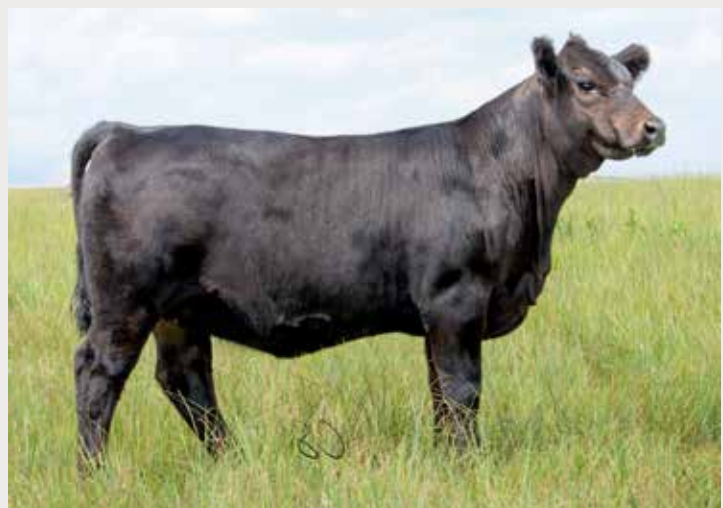
BROOKS PAYWEIGHT F91 / Lot 8