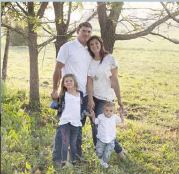
THE HANEL FAMILY