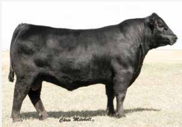
CONNEALY CAPITALIST 028 / Sire of Lots 27 & 28.

LOT 27 HANELS MISS CAP E7016 ASA# 3331024 1/2 SM 1/2 AN Cow DOB: 1/4/2017 Tattoo: E7016