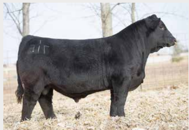
RUBY'S TURNPIKE 771E / Sire of Lot 3B embryos

Offering 2 grade 1 and 1 grade 2 conventional embryos. Guaranteeing 1 pregnancy if implanted by a certified embryologist.