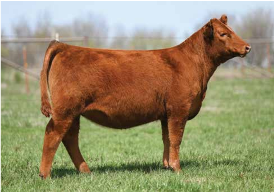
LOT 16 JCL CUPCAKE

JCL Cupcake is a daughter of the past sale highlight and many times champion for the Johnson family, JCL Jackie-O! A stunning profile and the extra mass and power that set her dam apart at this exact age is one of the many reasons that JCL Cupcake has been a favorite since day one! She is so elegant in her design, neat chested, and offers a long and square hip design. A big time show heifer prospect with the cow family credentials to be an even bigger force once she enters production. The type and kind that you have come to associate with the "JCL" prefix!