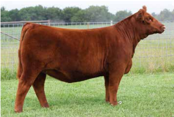
JCL JACKIE-O Maternal Sister to Lot 11