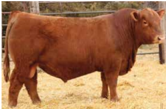
PIE MILESTONE 9713 Sire of Lots 12 & 13