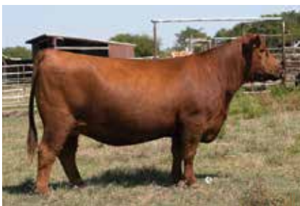
JCL ICE QUEEN 912G Full Sister to Lot 1

The matriarch of JCL Red Angus, there is no denying the influence that JCL Fire N Ice has had during her production career. A picture perfect udder design that is further complimented by overwhelming body mass and dimension. However, it is her skeletal integrity that elevates her to a league of her own! Countless maternal sibs to this female have been past high sellers for the JCL program, with several National division winners that have now become individuals of influence within their respective programs. She is a full sister to JCL Ice Queen 912G, the $17,200 high selling female in the JCL Red Angus Fall 2022 Sale. JCL Ice Storm 805F is also a full brother to JCL Fire N Ice, one of the most popular bulls ever campaigned by the program. The influence of the legendary “Jade” has been nothing short if incredible. Maternal sibs would also include the National Division Champion, JCL Frio 101J, as well as JCL Bandito 909G. The legacy that “Jade” will leave on the Red Angus breed will remain everlasting! Here is your chance to acquire what some of the most astute cattlemen in the business consider to be the greatest daughter of “Jade” in existence – Bid with confidence here! Pasture exposed to JCL POLO 12/31/22-1/31/23. Veterinarian Confirmed Safe on 4/6/23.