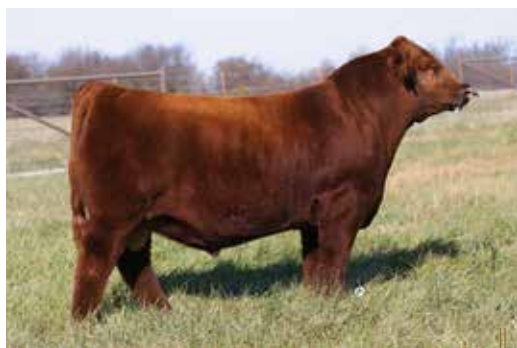
LOT 111 JCL FRIO 101J