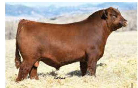
H/H SILENT MAJORITY Sire of Lot 17

JCL Latte is the second direct daughter of JCL Jackie-O, the dominant show heifer turned prolific producer! She is sired by H/H Silent Majority 0248, the Red Six Mile Big Timber 654C son that is backed by the influence of the legendary Bieber Hard Drive Y120. Exquisite about her head and neck, big topped, thick ended, and loaded with quality from end to end! A very unique female that is an outlier in terms of substance and bone.