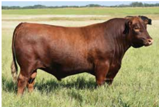
LOT 128 RED DKF RAZOR 55C