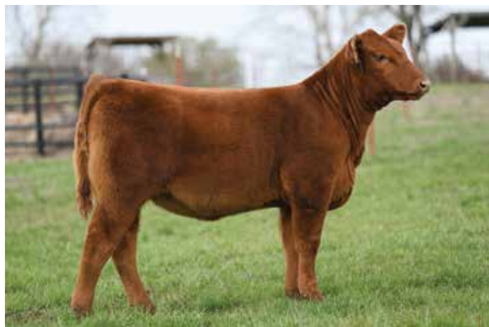
LOT 30 JCL MIMOSA