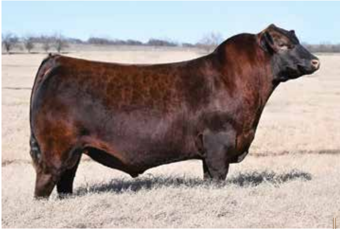
TWG RED EYE SPECIAL 301F Sire of Lots 22A-C Embryos