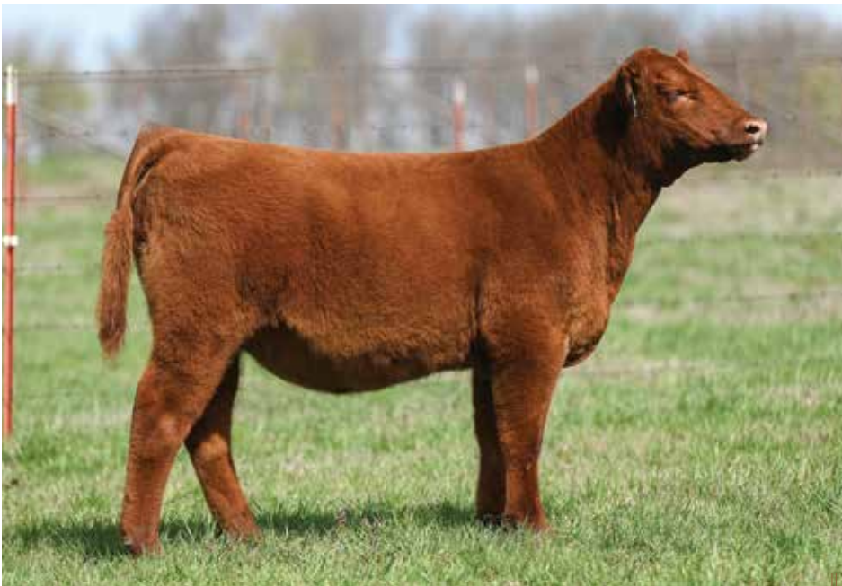
LOT 17 JCL LATTE

JCL Latte is the second direct daughter of JCL Jackie-O, the dominant show heifer turned prolific producer! She is sired by H/H Silent Majority 0248, the Red Six Mile Big Timber 654C son that is backed by the influence of the legendary Bieber Hard Drive Y120. Exquisite about her head and neck, big topped, thick ended, and loaded with quality from end to end! A very unique female that is an outlier in terms of substance and bone.