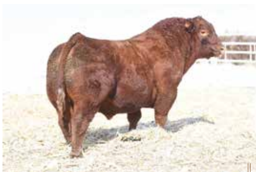
LOT 129 RED SSS MAXIMUM 165B