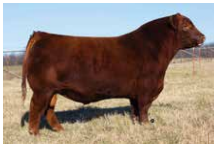
TWG TANGO 156D Sire of Lot 8