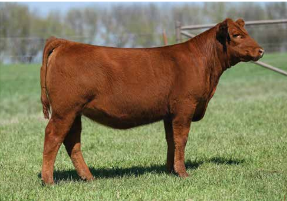
LOT 10 JCL SANDRA DEE

A fall born show heifer prospect from the legendary JCL Fire N Ice that is sired by the $25,000 PIE Milestone 9713. She is one that has to be admired for the extra body, bone, and substance that she brings to the table. A feminine featured female that is long fronted, smooth shouldered, and long sided. We anticipate this female to be a force as a heavy bred, and her lineage suggests she will continue to get better every day of her life. The chances of owning a direct daughter of JCL Fire N Ice are become slim, invest in the future of your breeding program with this genetic masterpiece!