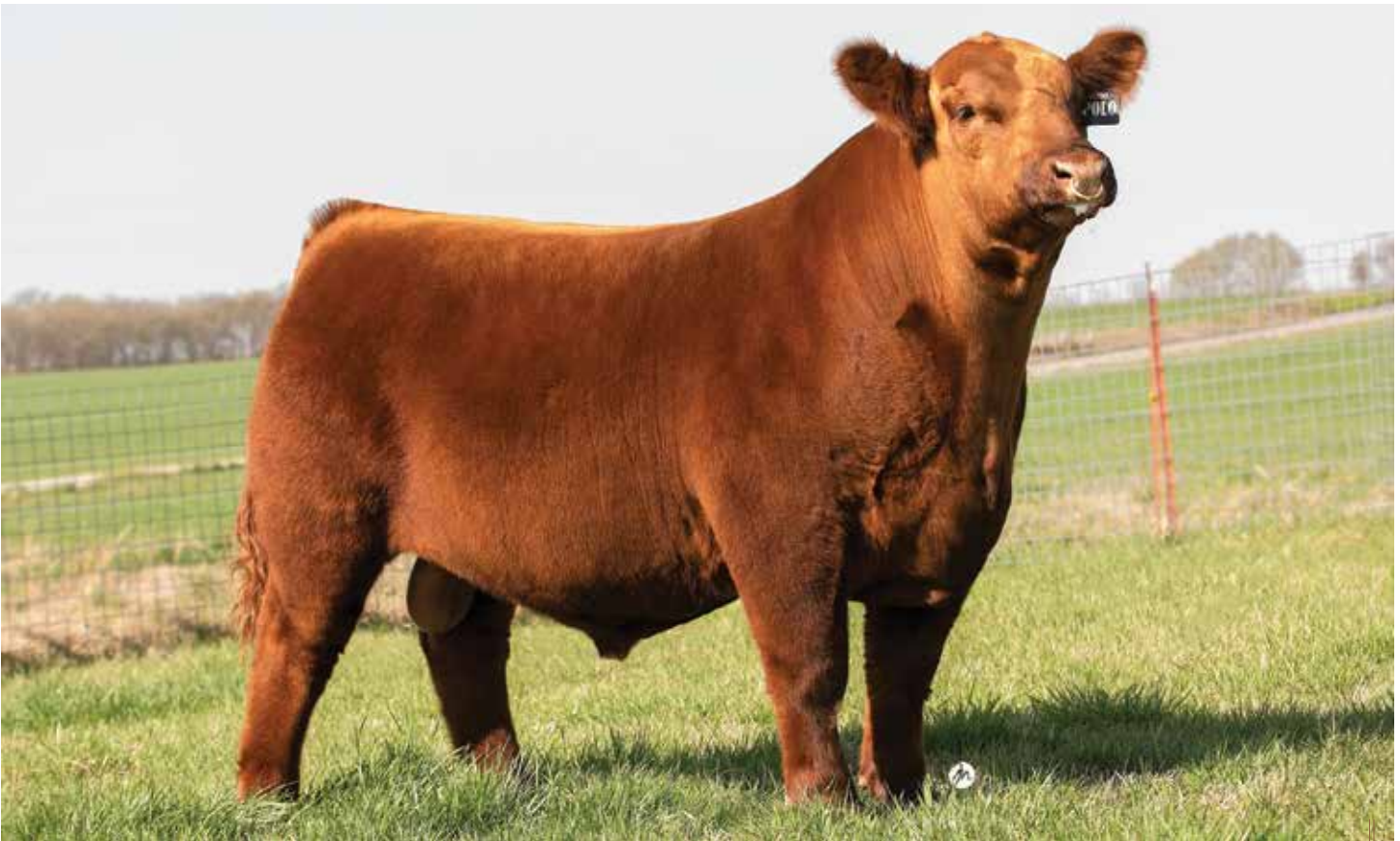
LOT 40 JCL POLO