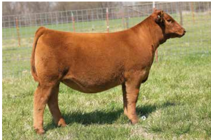
JCL CRANBERRY 049H $9,500 Daughter of Lot 36

RLC Cherabel 227E is a high marbling daughter of Bieber Federalist B543 that is supported by the influence of Red Six Mile Sakic 832S, the sire of the legendary PZC TMAS Firestorm 1800 ET. She is the dam of the $9,500 JCL Cranberry 049H, a sharp featured daughter of JCL Ice Storm 805F that was purchased by Charleigh Barnes of Arkansas. Another proven and predictable female that has the ability to generate!