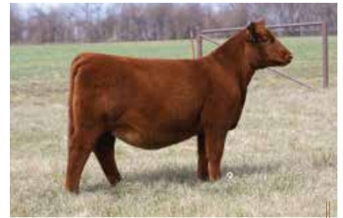
JCL JOJO 131J Maternal Sister to Lots 16 & 17