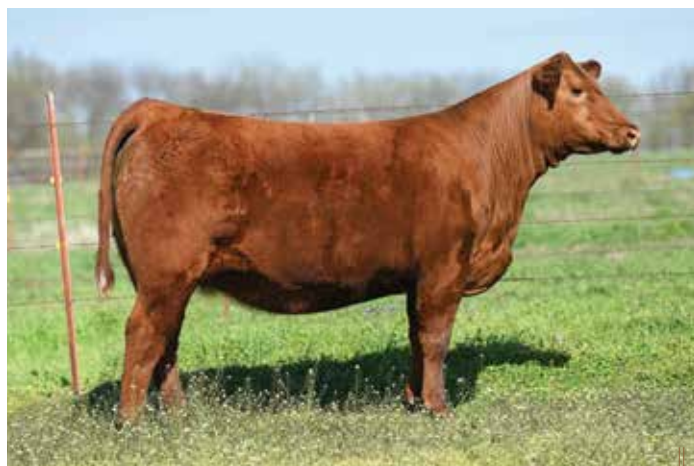
LOT 35 JCL JENNIE 117J

117J is a daughter of Jeffries Rose E403 that is sired by KJHT Power Take Off. She sells safe in calf to JCL Neptune, the WEBR Maxed Out 627 son of Royce's Sensational 14. Royce's Sensational 14 was the $54,000 high selling female in the 2017 NWSS Red Angus Sale. This mating will yield an elite number profile with breed leading growth data. Pasture Exposed to JCL NEPTUNE 3/1/23-5/1/23. Will be preg checked on 4/27/23.