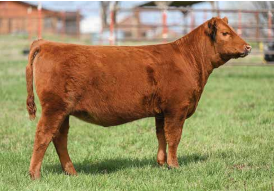
LOT 15 JCL JACKIE'S GIRL

This November born prospect is sired by JCL Deep Freeze, the outcross pedigree herd sire that works for the Diamond R Cattle Company firm. She is bold bodied, deep sided, and offers a low input brood cow look. JCL Jackie's Girl is the natural born calf from JCL Jackie 812F, the female that sells as Lot 11.