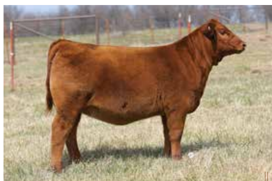
JCL BROWN SUGAR 185J Full Sister to Lots 18 & 19