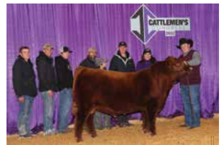
JCL FRIO 101J Maternal Brother to Lot 1