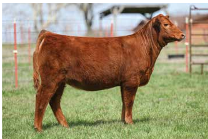
LOT 21 JCL CHERRY