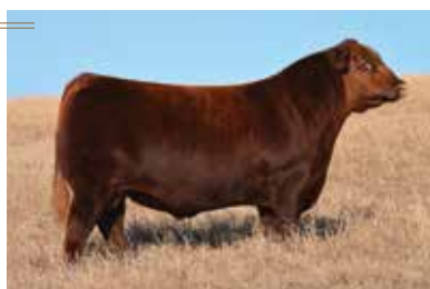
LOT 120 TWG TOMMY JACK 166A