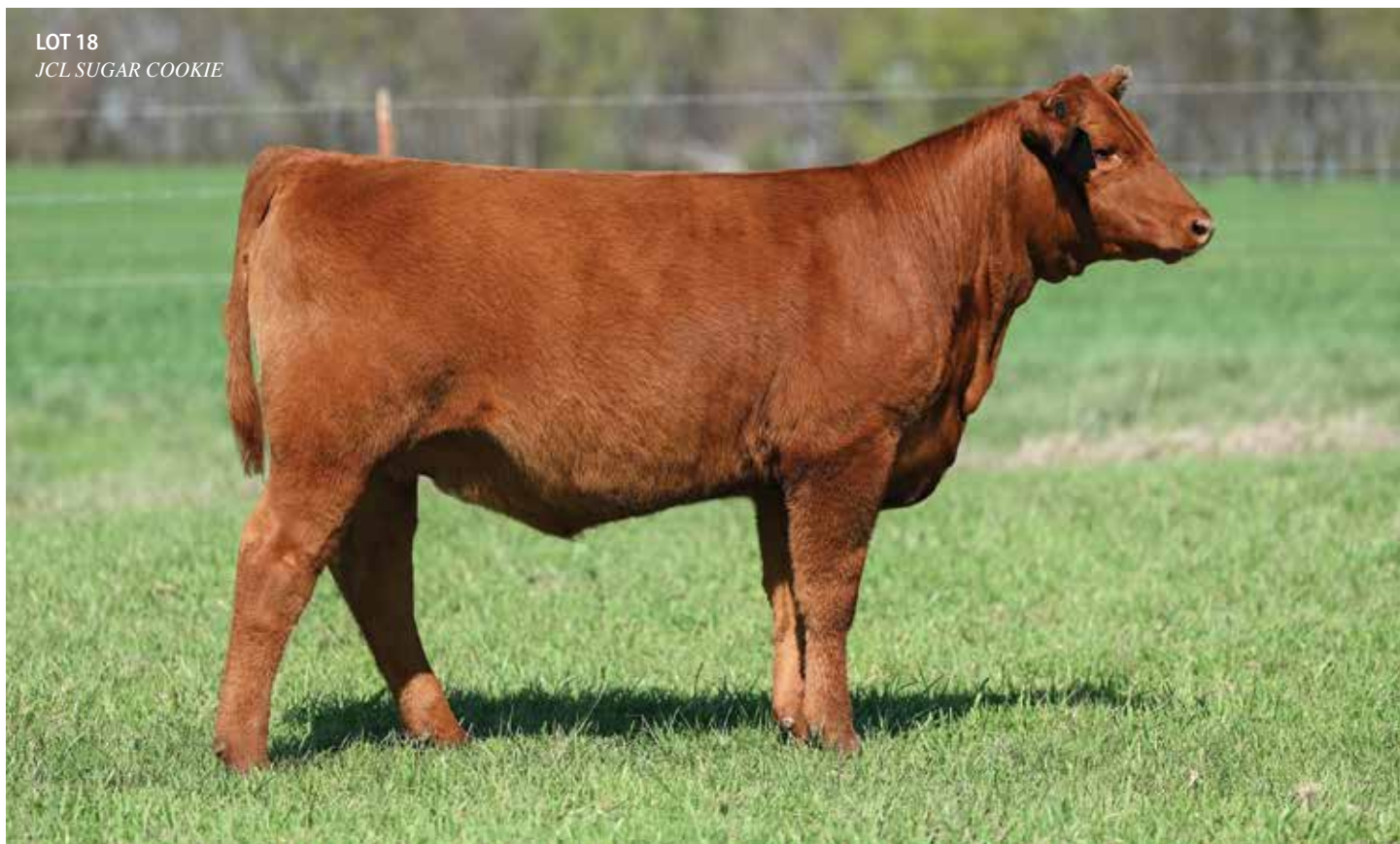
LOT 18 JCL SUGAR COOKIE