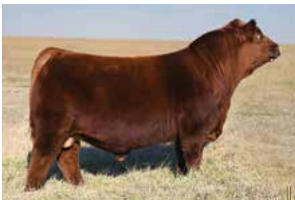
JCL HOSS 931G Son of Lot 23