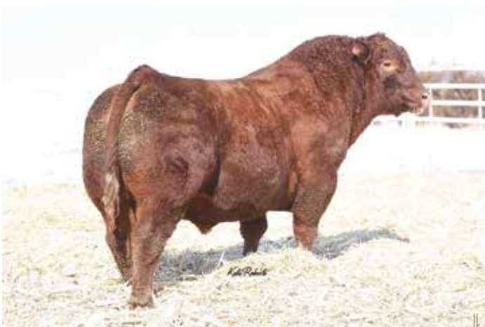
RED SSS MAXIMUM 165B Sire of Lot 51 Embryos

The next set of embryos will generate either Percentage Red Angus or red hided LimFlex cattle with extra quality and marketability. JCL Melissa 909W is one of the last red hided Limousin females that ever set foot in Welch, Oklahoma. This mating is anticipated to offer extra power, shape, and density.