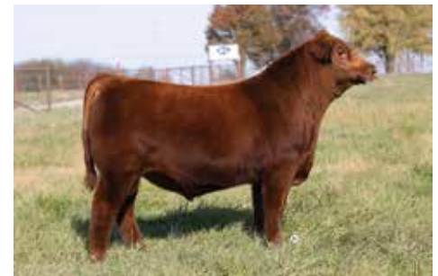
JCL DEEP FREEZE Sire of Lot 15

This November born prospect is sired by JCL Deep Freeze, the outcross pedigree herd sire that works for the Diamond R Cattle Company firm. She is bold bodied, deep sided, and offers a low input brood cow look. JCL Jackie's Girl is the natural born calf from JCL Jackie 812F, the female that sells as Lot 11.