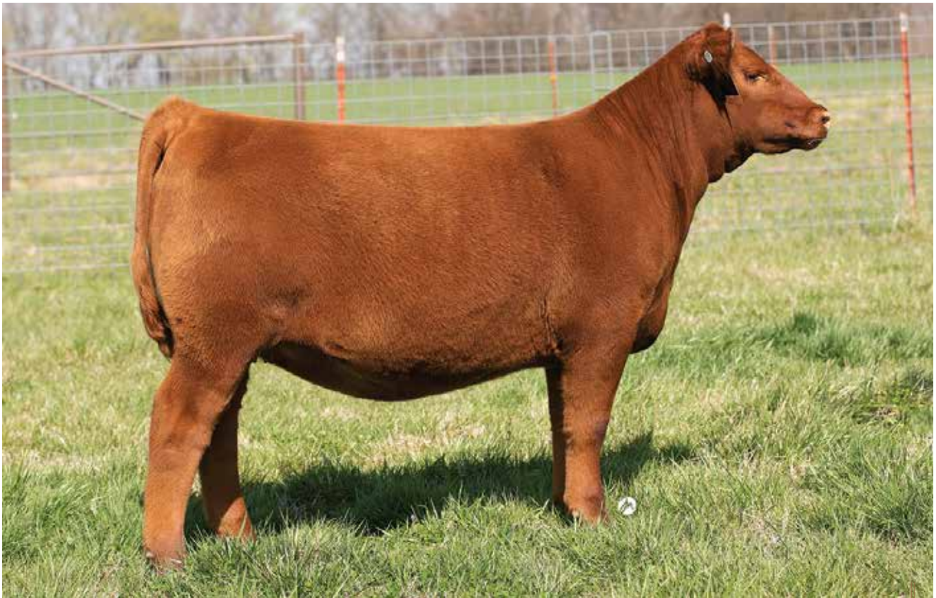
LOT 7 JCL GOLLY 031H