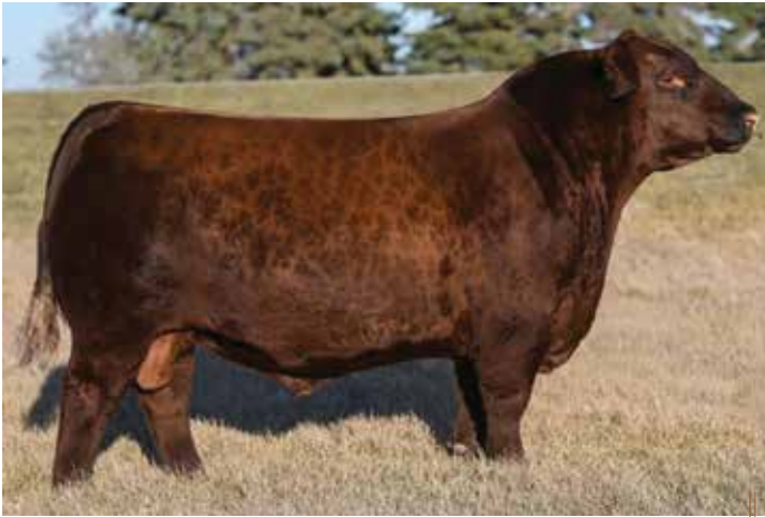
KJHT POWER TAKE OFF Sire of Lot 3 Embryos