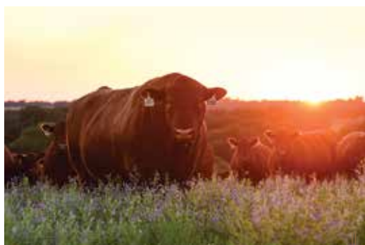
LOT 119 RED SOO LINE POWER EYE 161X