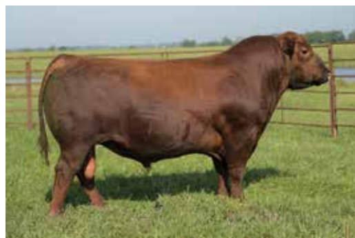
LOT 133 LACY FOUNDATION 448