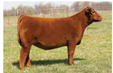
JCL DOLLY 036H Full Sister to Lots 6-8