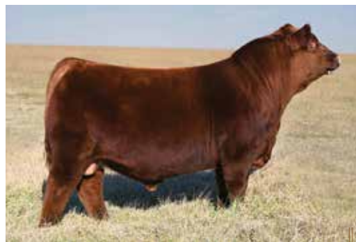
LOT 113 JCL HOSS 931G