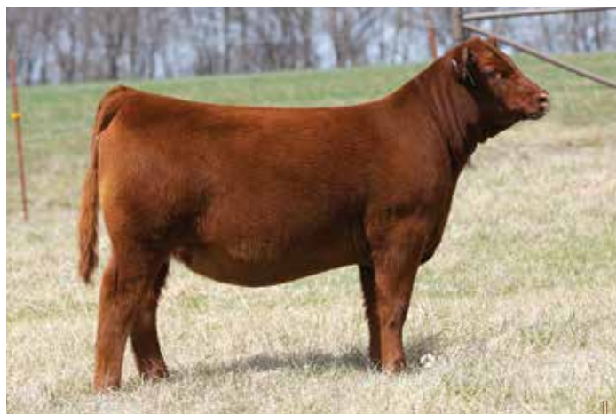
JCL SAMMIE JO 144J Full Sister to Lot 49 Embryos