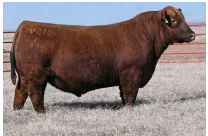
DUFF RED BEAR 18154 Sire of Lot 28 Embryos

JCL Calypso 08H is the $20,000 valuation female that was purchased by Sara Sullivan in 2020. She is sired by TWG Tango 156D and out of Rojas Duchess 8321. A soft bodied, sound structured female that offers a look of quality and maternal excellence. She sell safe in calf to JCL Polo! Pasture exposed to JCL POLO 1/1/23-3/10/23. Veterinarian Confirmed Safe on 4/6/23.