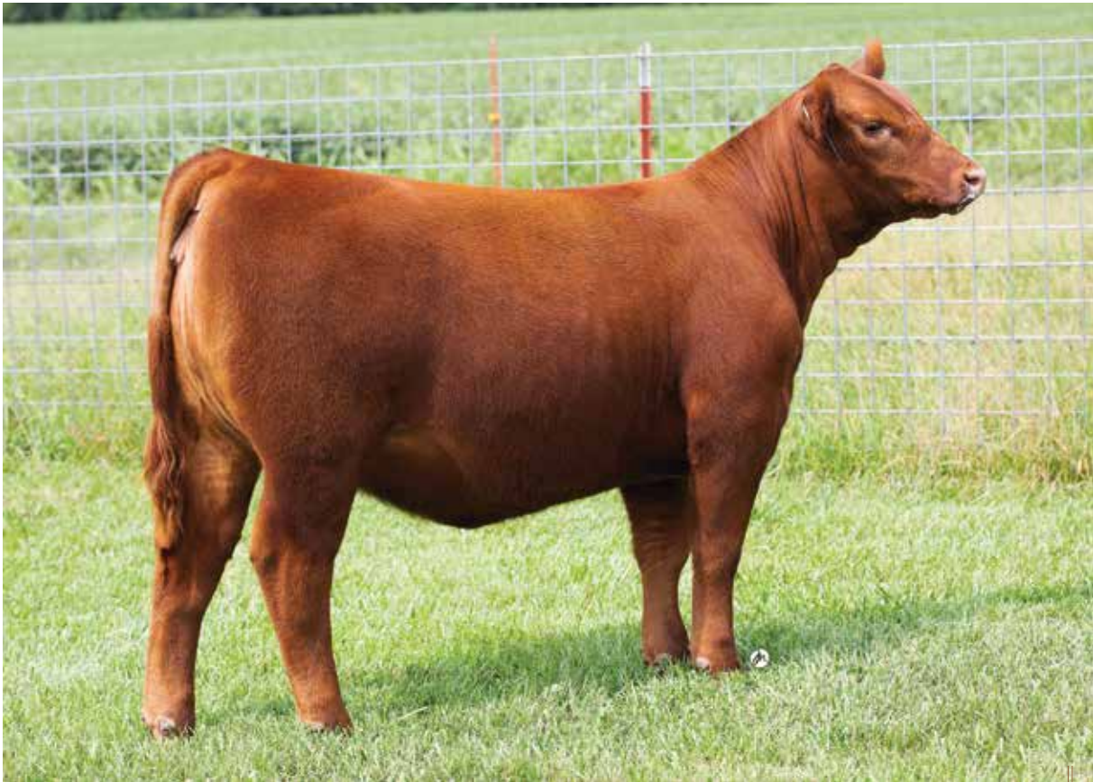
LOT 27 JCL CALYPSO 08H