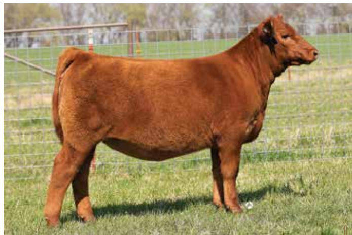
JCL RASPBERRY 045H $7,500 Daughter of Lot 37

37A: BULL CALF BORN 3/8/23. SIRED BY JCL POLO.