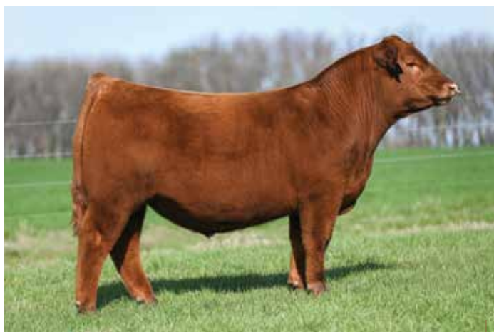
LOT 45 JCL GOTCHA