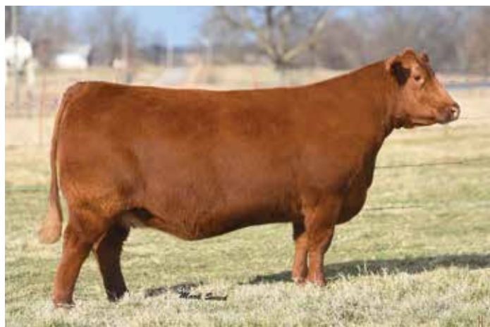
ROYCE'S SENSATIONAL 14 Granddam of Lot 41