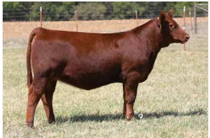
JCL BURGANDY Maternal Sister to Lots 22A-C Embryos

Lot 22C EMBRYOS Sire 3962379 | Dam 1750275 100% AR 3 SEXED FEMALE EMBRYOS