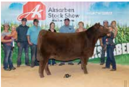
JCL POLLY Full Sister to Lots 6-8