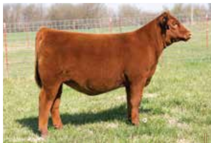
JCL CINNAMON 035H $30,000 valued daughter of Lot 23