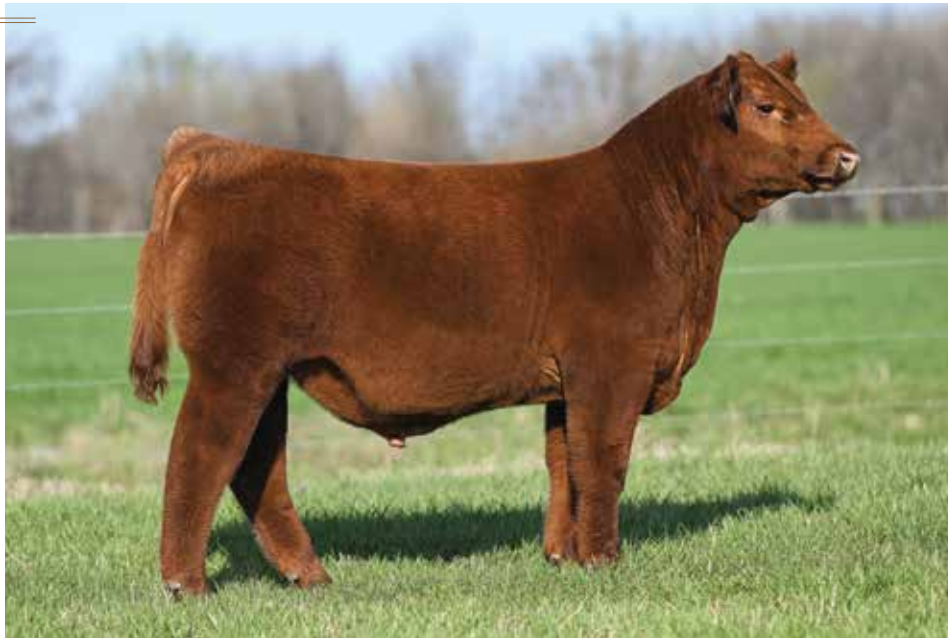
LOT 43 JCL FIRE MAN