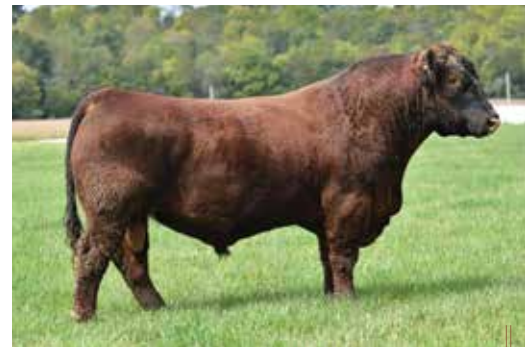
LOT 116 MLK BIG FOOT

Lot 115C SEMEN KJHT POWER TAKE OFF 5 Units Reg: 3525459 100% AR