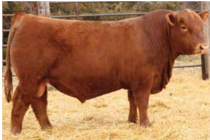
PIE MILESTONE 9713 Sire of Lots 48A-B Embryos

This set of embryos are the result of splitting a flush between two sires, so the resulting progeny will have to be DNA parent verified. The two sires used in this flush were TWG Tango 156D and MLK Big Foot, two very popular sires that have a great track record of siring elite Red Angus seedstock. The dam of the embryos selling is Basin Sam 8948, the dam of the $11,500 JCL Sammie Jo 144J that was selected by Aubri Atkinson of Texas. JCL Sammie Jo 144J was sired by MLK Big Foot, making her a potential full sister to the embryos selling.