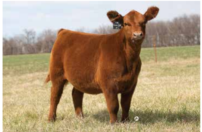
JCL COVER GIRL 138J Daughter of Lot 11