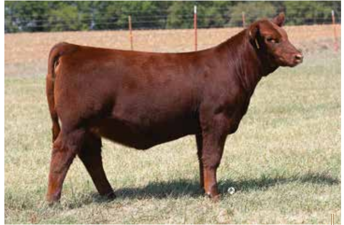
JCL MAROON Full Sister to Lots 22A-C Embryos

Lot 22A EMBRYOS Sire 3962379 | Dam 1750275 100% AR 3 SEXED FEMALE EMBRYOS