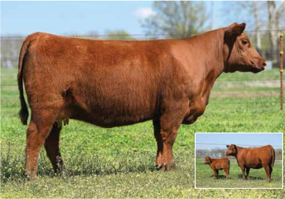
LOT 9 JCL NITA 121J

JCL Nita 121J is another direct daughter of JCL Fire N Ice, the donor that sells as Lot 1. She is sired by the popular $80,000 Duff Red Bear 18154, one of the greatest Mann Red Box 55C sons to ever surface. 121J is a carbon copy of her dam, offering a beautiful profile with a surplus of body and capacity. We love the silhouette that this female offers from the side, while still remaining three-dimensional and robust from behind. She has a striking March born heifer calf at side that is sired by the National Champion, JCL Polo!