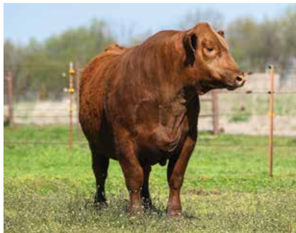
LOT 46 JCL NEPTUNE

An elite calving ease prospect sired by the $70,000 EGL Guidance 9117, there is no question that JCL Gotcha has the resume to be a leading heifer bull option with semen marketability. His dam is the impressive JCL Molly 03H, the featured young donor that sells as Lot 6. She is a direct daughter of the Lot 1 donor, JCL Fire N Ice. JCL Gotcha ranks among the top 12% of the breed for CED and top 8% CEM. He further solidifies his calving ease credentials with a modest 71 pound actual birth weight. Calving ease genetics without sacrificing maternal excellence!