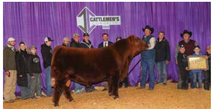
JCL POLO 2022 Cattlemen's Congress Grand Champion Red Angus Bull