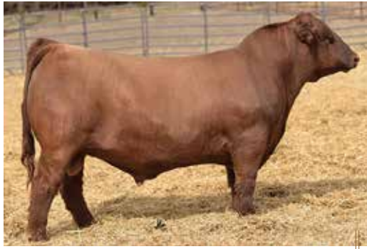
LOT 122 WEBR MAXED OUT 627