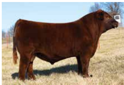
JCL ICE STORM 805F Full Brother to Lot 1