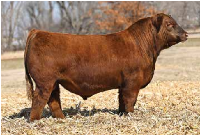
WEBR RED REVIVAL 78H Sire of Lot 4 Embryos

This is a mating that we believe has the chance to ring the bell! Sired by the now deceased WEBR Red Revival 78H, the $47,500 high selling bull from the 2021 Weber Land & Cattle Red Angus Bull Sale that was selected by Bayou Creek Ranch. This mating is destined to yield cattle with an elite look of quality and style!