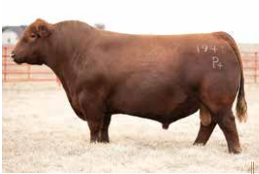
LOT 108 DUFF RED WOOD 1941