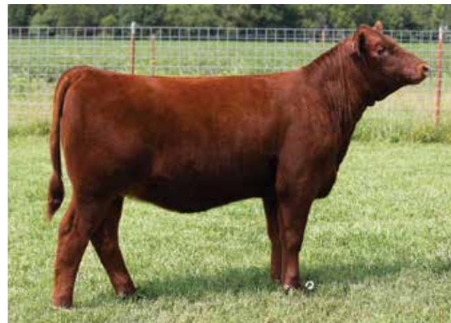
JCL HILDA 07H Daughter of Lot 34

Jeffries Ms Primrose C20 is a female that is elite in every sense of the word! Not only is C20 a productive female that offers a fundamentally correct build, but she also is a proven producer in the JCL program where she most recently produced a $6,500 heifer that was purchased by Mendy Detherage and a $5,200 heifer that was selected by Colton Kalous. C20 ranks among the elite 1% of the Red Angus breed for WW, YW, ADG, and CW. She also tanks top 4% GM, top, top 10% Marb, top 13% REA, and top 27% Milk. Her number profile positions her as one of the only females in the Red Angus data base with her combination of growth, carcass merit, and maternal traits. Pasture exposed to JCL POLO 4/1/23-5/1/23. Will be ready to IVF.