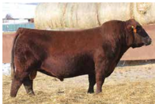
LOT 132 HXC BIG IRON 0024X