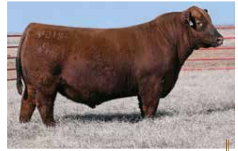
DUFF RED BEAR 18154 Sire of Lot 9

JCL Nita 121J is another direct daughter of JCL Fire N Ice, the donor that sells as Lot 1. She is sired by the popular $80,000 Duff Red Bear 18154, one of the greatest Mann Red Box 55C sons to ever surface. 121J is a carbon copy of her dam, offering a beautiful profile with a surplus of body and capacity. We love the silhouette that this female offers from the side, while still remaining three-dimensional and robust from behind. She has a striking March born heifer calf at side that is sired by the National Champion, JCL Polo!