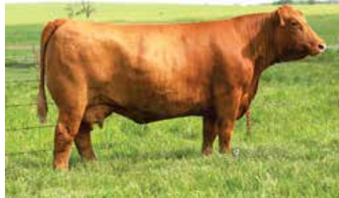
JCL MELISSA 909W Dam of Lot 50 Embryos