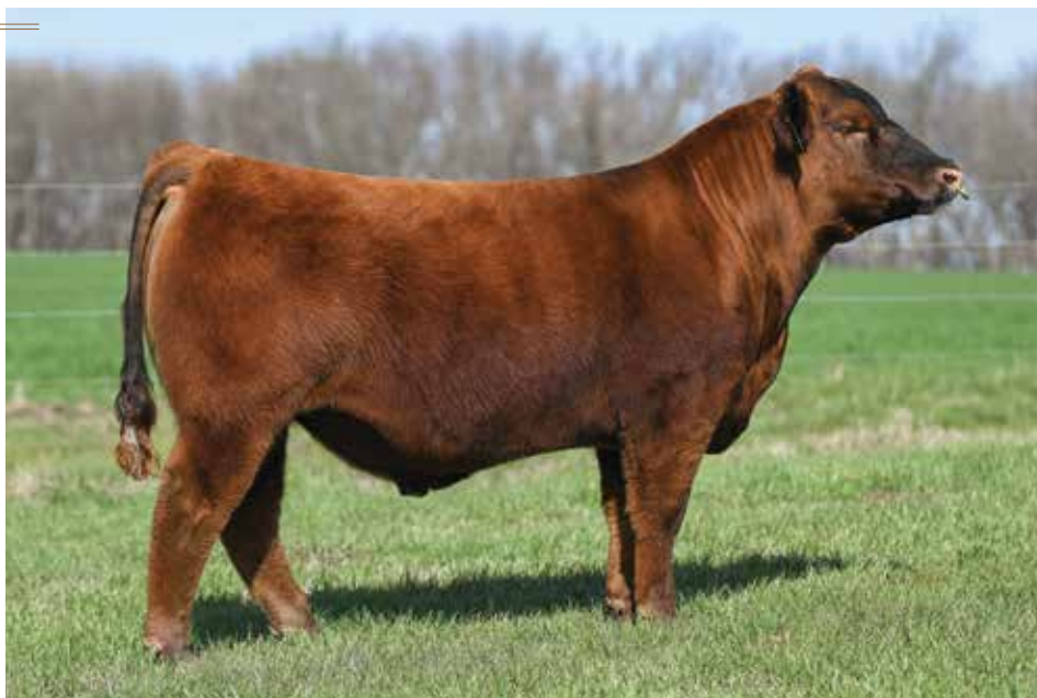
LOT 42 JCL SLINGSBY