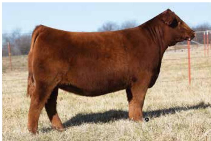
PL MISS NOVEMBER 769E Dam of Lot 42