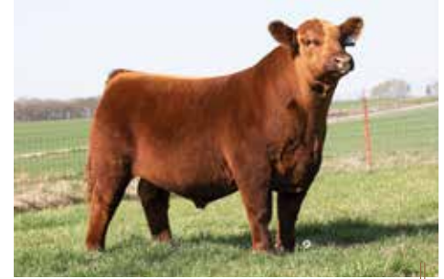
JCL POLO Sire of Lot 14

Here is another October born prospect from JCL Jackie 812F, this time sired by the National Champion, JCL Polo! She is so elegant from the side, offering a neatly chiseled front third design that ties high at the top of her shoulder. She remains bold and robust from her forerib back into her rear rib and flank. A square built female that has been blessed with the "extras" in terms of bone, hair, and substance. A must see on sale day!