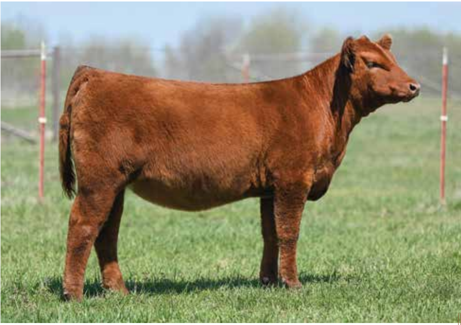
LOT 14 JCL MOCHA

Here is another October born prospect from JCL Jackie 812F, this time sired by the National Champion, JCL Polo! She is so elegant from the side, offering a neatly chiseled front third design that ties high at the top of her shoulder. She remains bold and robust from her forerib back into her rear rib and flank. A square built female that has been blessed with the "extras" in terms of bone, hair, and substance. A must see on sale day!