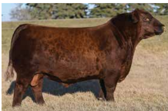
KJHT POWER TAKE OFF Sire of Lots 18 & 19