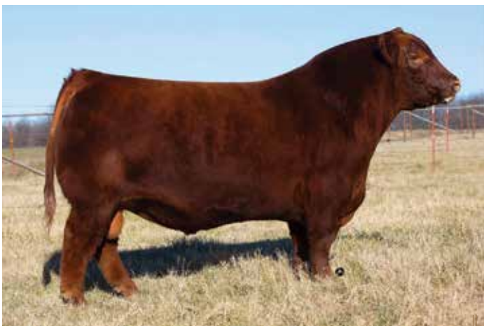
TWG TANGO 156D Sire of Lot 50 Embryos