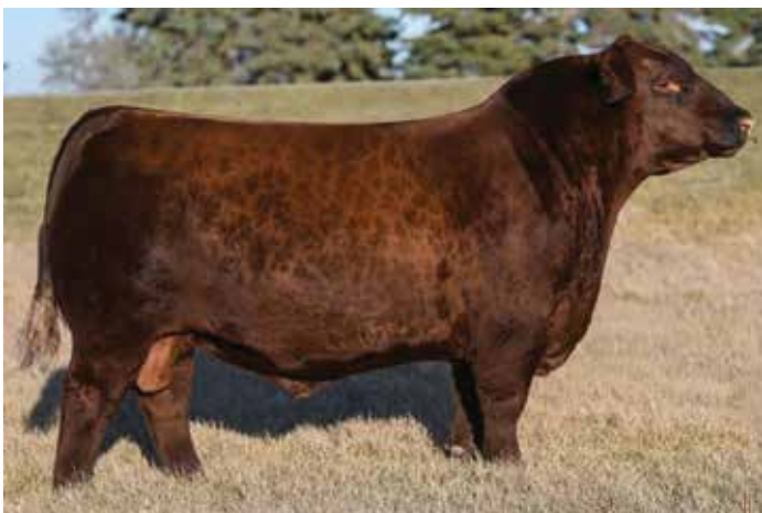
KJHT POWER TAKE OFF Sire of Lot 52 Embryos

Jeffries Ms Lakota Z11 was a top producing daughter of Red Fine Line Mulberry 26P that was selected from the Jeffries Red Angus program. She produced countless herd sires that were marketed at JCL Red Angus that would include: JCL Geronimo 124J, JCL Habanero 025, JCL Pablo 023, JCL Habanero 020, JCL Ranchero 019, JCL Poblano 018, JCL Jalapeno 016, and JCL Gaspacho 015H. Before her tenure at JCL Red Angus she produced the $25,000 ABS AI Sire, Jeffries Checotah 817C. This package of embryos are sired by Red SSS Maximum 165B, a true standout phenotypically. This mating is supported by the most consistent herd sire producing female that was in the JCL donor pen!