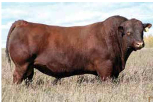
LOT 130 RED FLYING K MAX 159Y