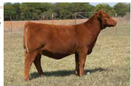
JCL CARAMEL Daughter of Lot 23