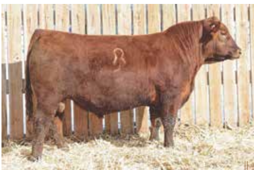
LOT 135 LEACHMAN PLEDGE A282Z