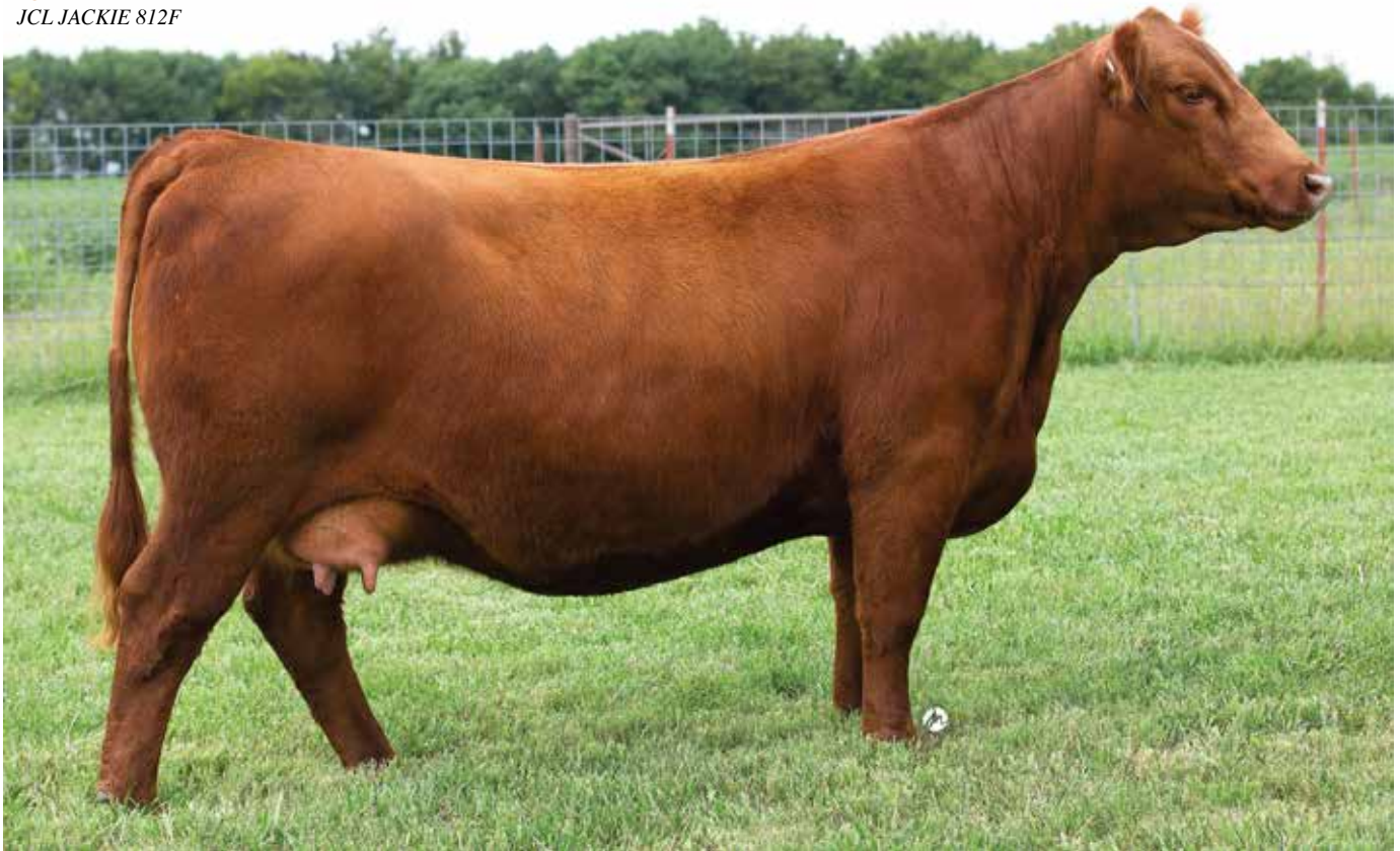
LOT 11 JCL JACKIE 812F