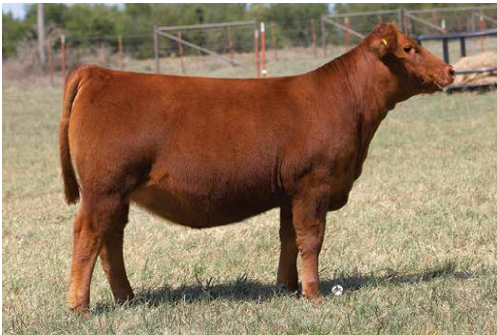
JCL BETTYE LOU Daughter of Lot 32