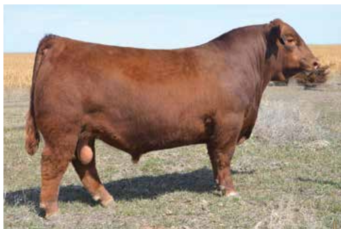
PIE ONE OF A KIND 352 Sire of Lot 25 Embryos