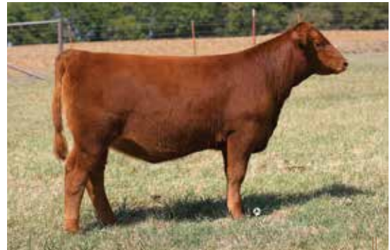
JCL ZHA ZHA Maternal Sister to 12 & 13