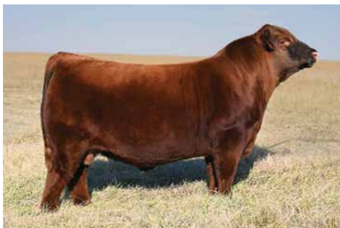
JCL DAYTON 923G Sire of Lot 24A-B Embryos