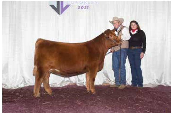
JCL MOLLY 03H 2021 Cattlemen's Congress Division Champion