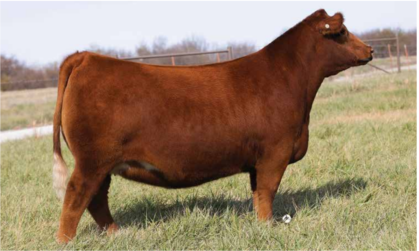
LOT 6 JCL MOLLY 03H