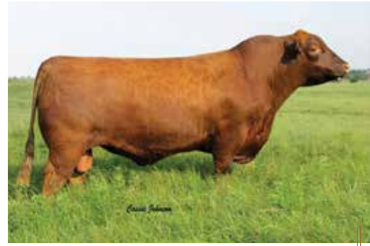
LOT 125 SLGN WIDELOAD 920W