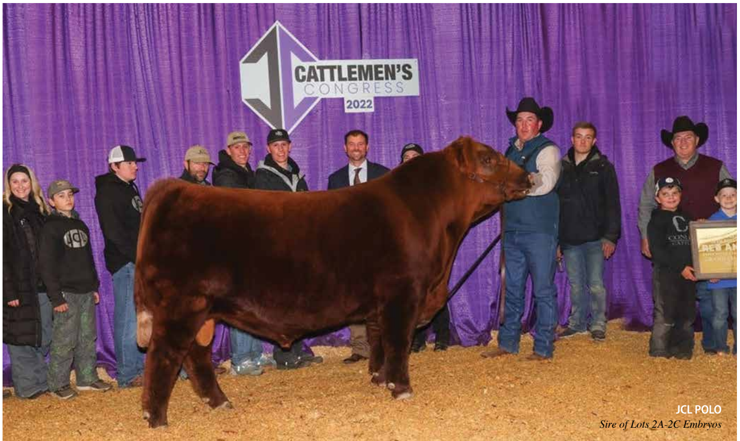
JCL POLO Sire of Lots 2A-2C Embryos