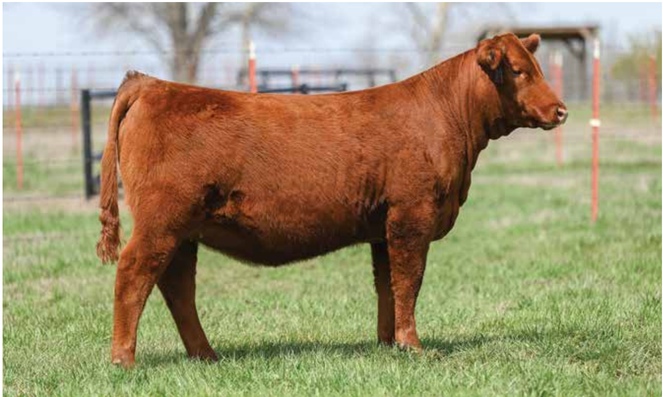
LOT 13 JCL SUZIE-Q