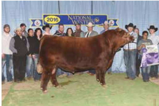
LOT 124 SIX MILE TAURUS 519A