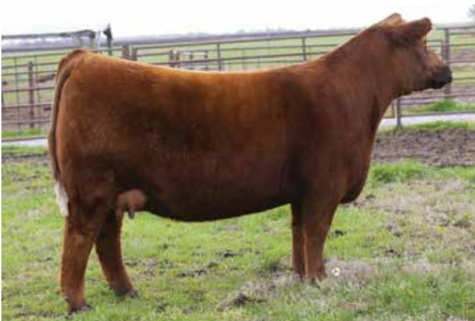
JCL FIRE N ICE Dam of Lots 6-10