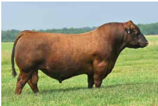
LOT 134 LACY IRON MIKE 005E