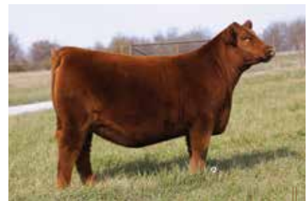
JCL GINGER 104J Daughter of Lot 23