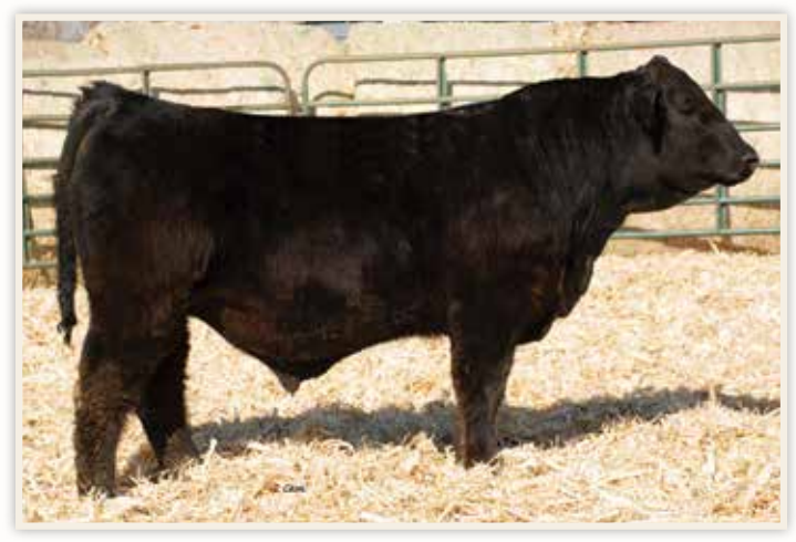
LOT 52 - WCS HUSKER 1049J