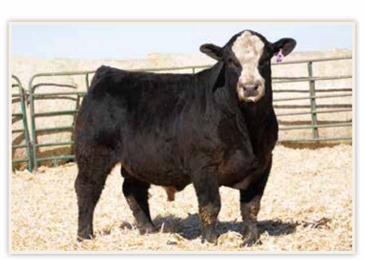
LOT 27 - WCS MAINSTAY 17J