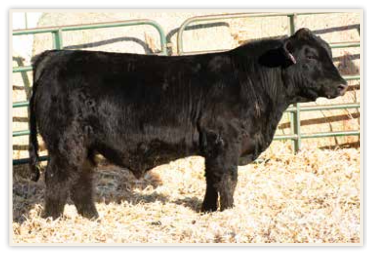
LOT 5 - WCS ROAD KING 143