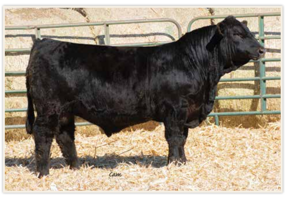
LOT 57 - WCS MAINSTAY 0702H