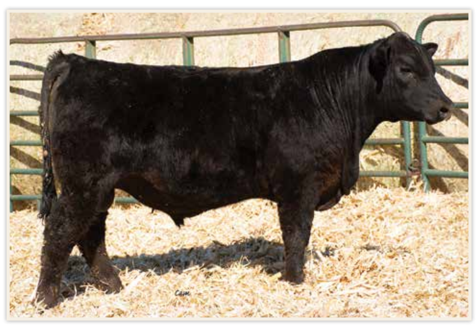
LOT 51 - WCS BISCUIT 1112J