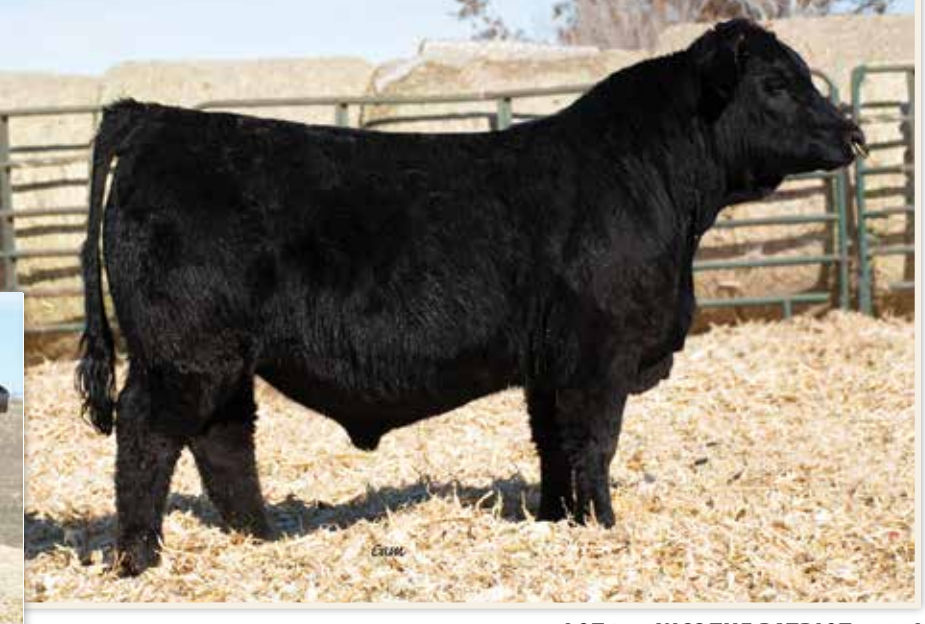
LOT 37 - WCS THE PATRIOT 1069J