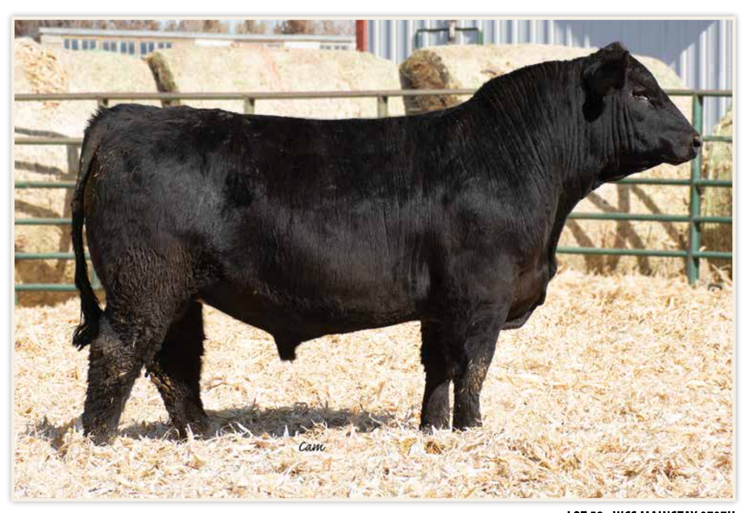
LOT 58 - WCS MAINSTAY 0707H

Bid, buy & watch the sale online DVAUCTION Broadcasting Real-Time Auctions www.dvauction.com