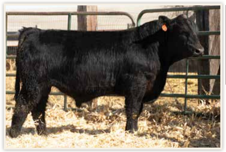
LOT 18 - WCS MAINSTAY 1815J

• We couldn't be more excited to show you these full brothers, all the early visitors to the ranch mark at least one if not a couple among their favorites, not only are they rugged and burly in their build but they surge to the front of the pack when it comes time to run over the scale. As with his brothers, 1813J has a structural build more than capable of maintaining and carrying this explosive growth pattern.