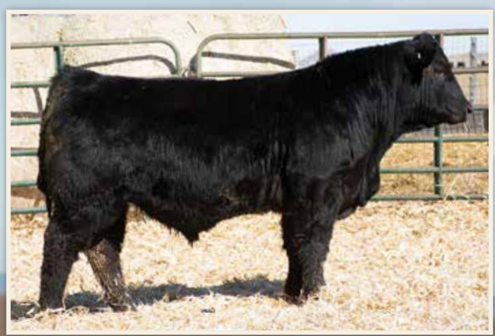
LOT 46 - VOLK BULL J316