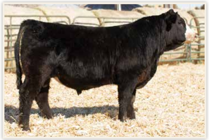
LOT 24 - WCS MAINSTAY 105J