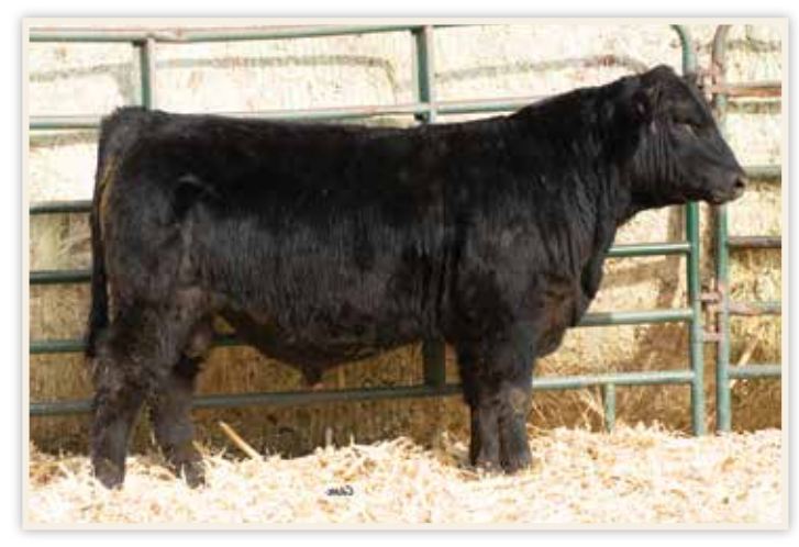
LOT 11 - WCS EXPRESS 1016J