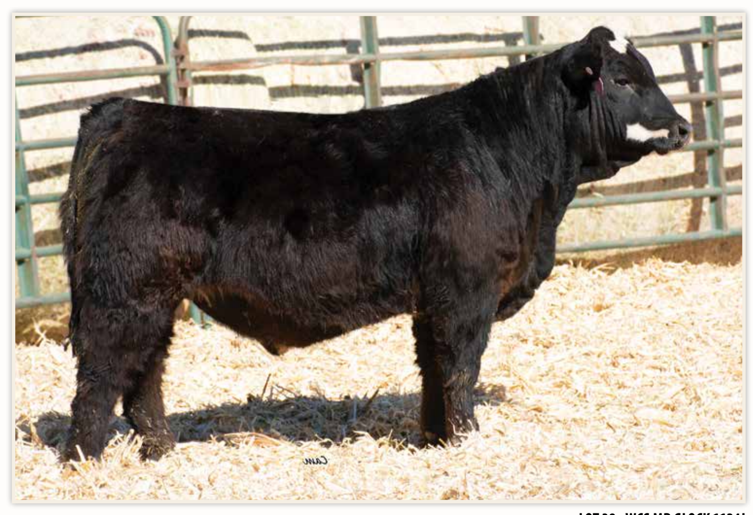
LOT 38 - WCS MR GLOCK 1124J