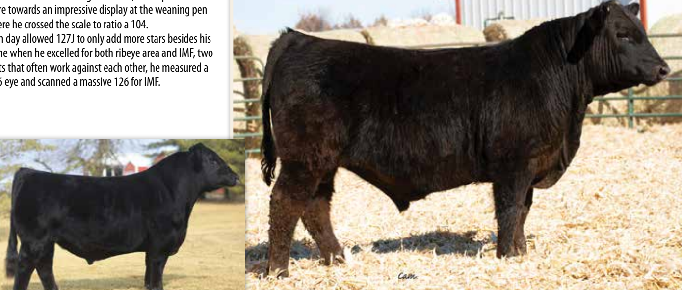
PATERNAL GRAND SIRE TO LOTS 34 - 36 CDI INNOVATOR 325D

• Scan day allowed 127J to only add more stars besides his name when he excelled for both ribeye area and IMF, two traits that often work against each other, he measured a 14.6 eye and scanned a massive 126 for IMF.