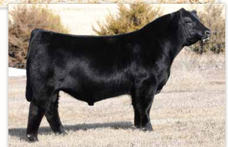
PATERNAL GRAND SIRE TO LOT 59 W/C RELENTLESS 32C

Portable panels, continuous fencing, freestanding panels feed bunks and fence posts Trevor Kahl - Crawford, NE 308-430-8550