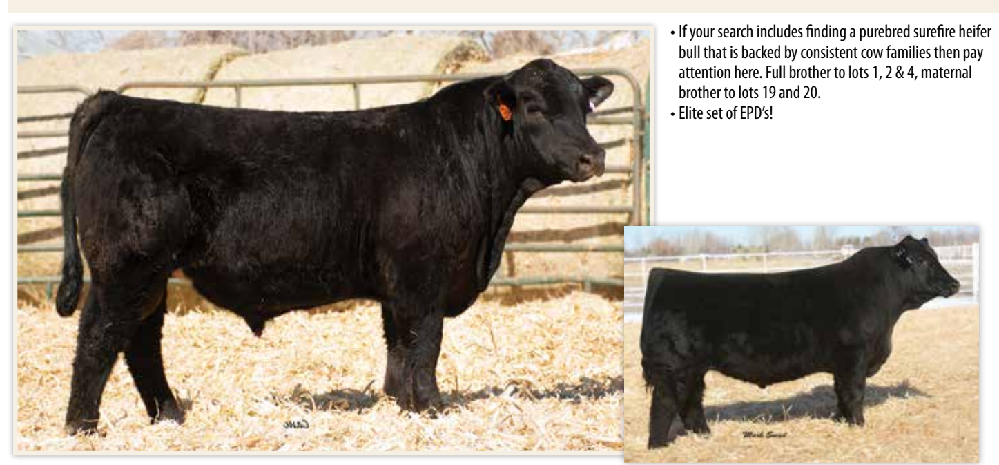
LOT 3 - WCS EXPRESS 1810J