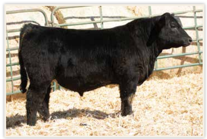
LOT 8 - WCS MR EXPRESS 1075J