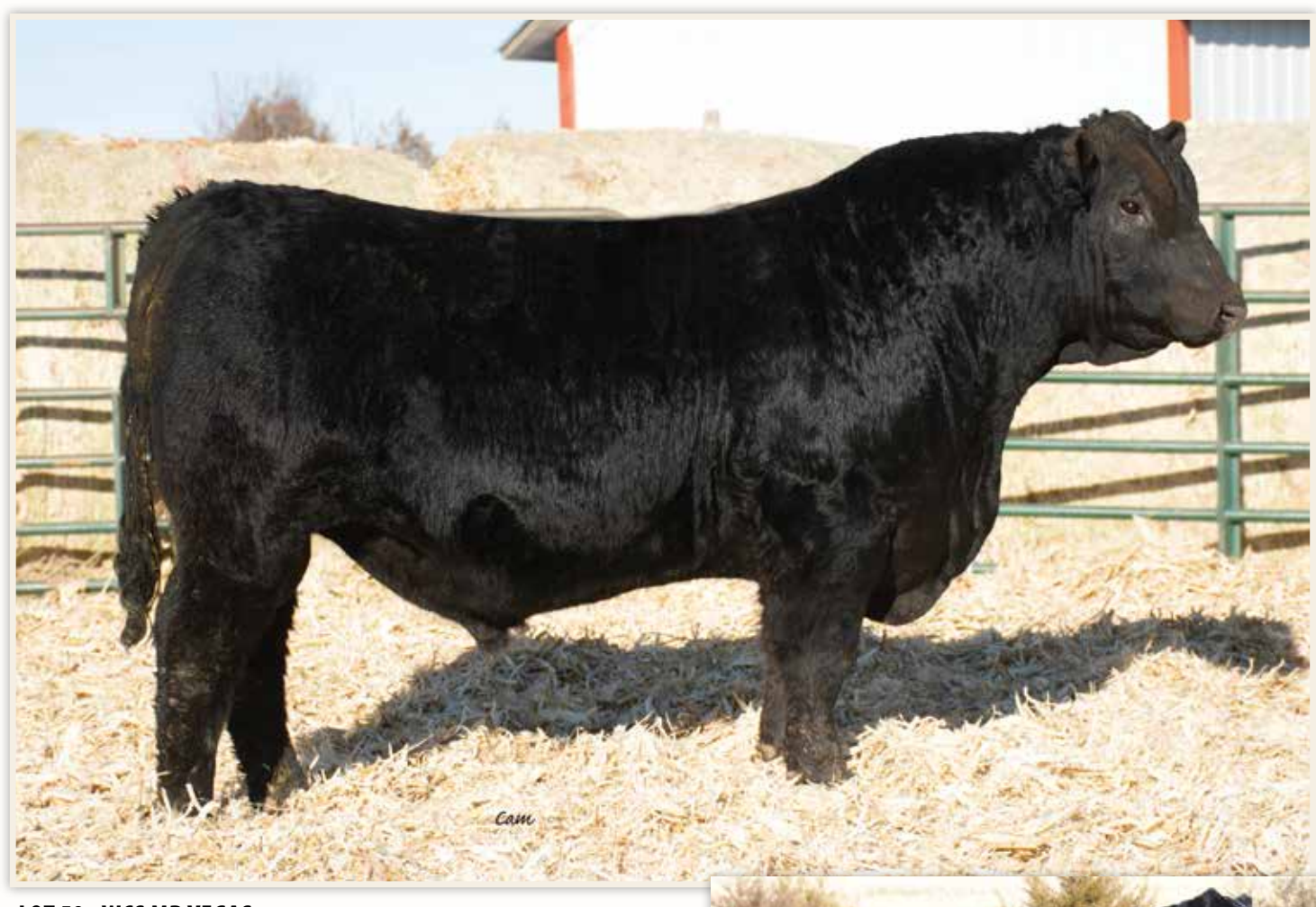
LOT 59 - WCS MR VEGAS

3/1/20 REG 3763598 TATTOO 035H HOMOZYGOUS POLLED HOMOZYGOUS BLACK