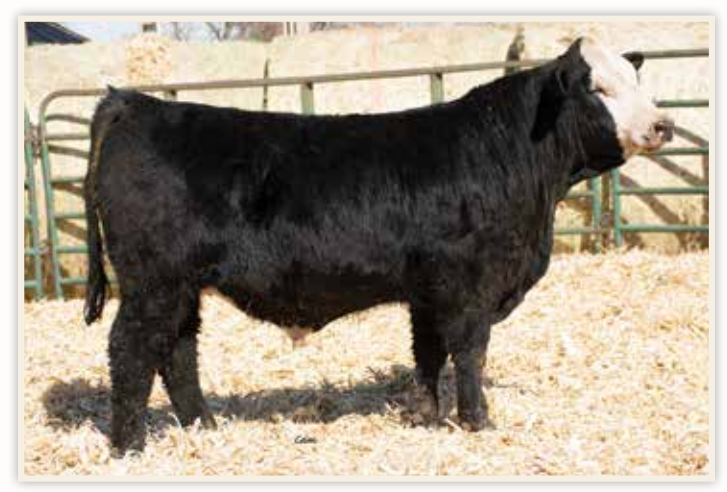
LOT 28 - WCS MAINSTAY 102J

2/28/21 REG 3930490 TATTOO 102J HOMOZYGOUS POLLED HOMOZYGOUS BLACK