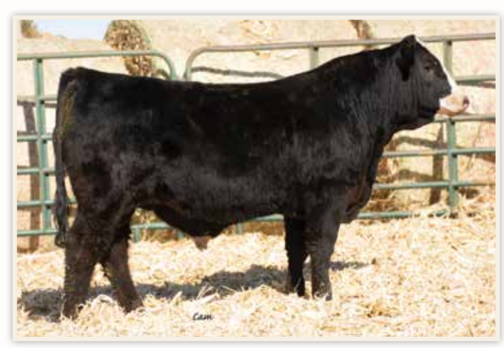
LOT 29 - WCS MAIN 147J