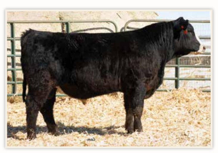
LOT 20 - WCS MAINSTAY 1817J

The full brother to lot 20 that came to the chute with a little more ribeve area and IMF on scan day, in fact he scanned with the most intramuscular fat of any Mainstay son in the offering.