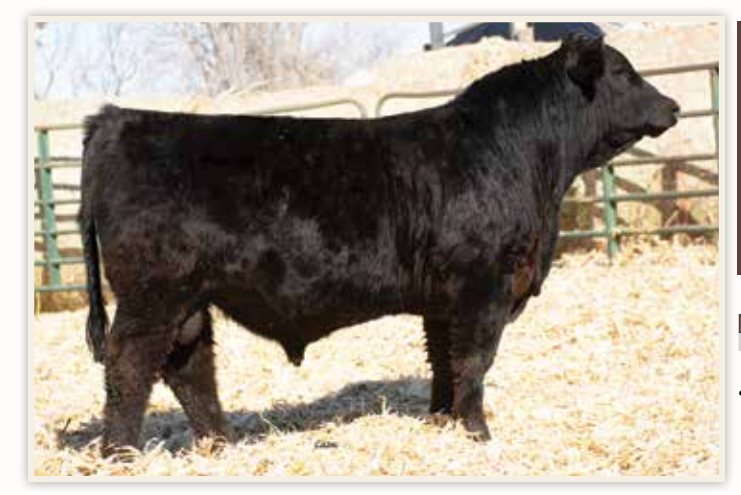
LOT 30 - WCS MAINSTAY 137J