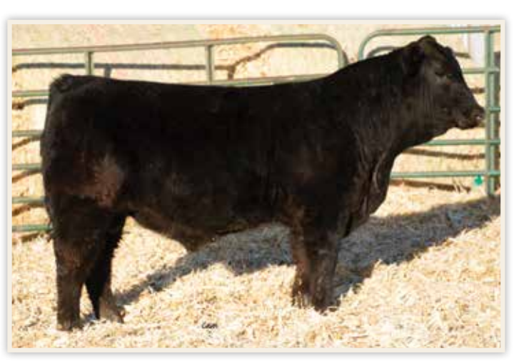
LOT 7 - WCS EXPRESS 194J