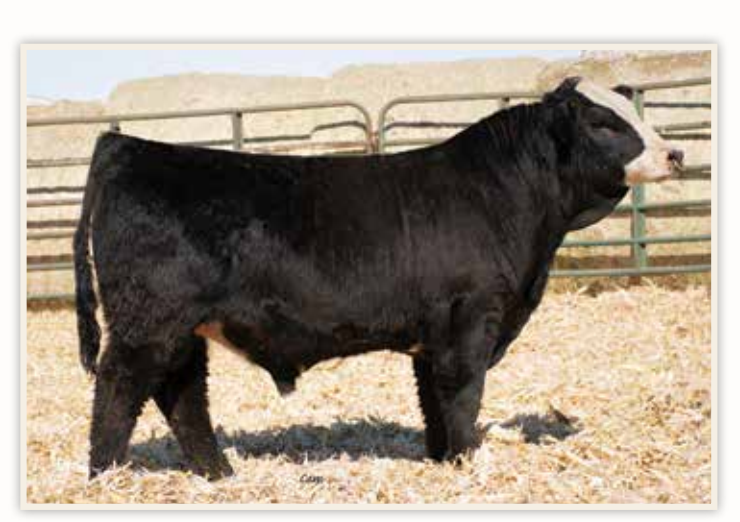
LOT 21 - WCS STAY WITH ME 123J