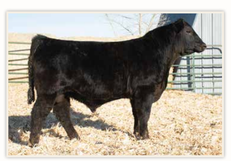
LOT 26 - WCS MAINSTAY 107J