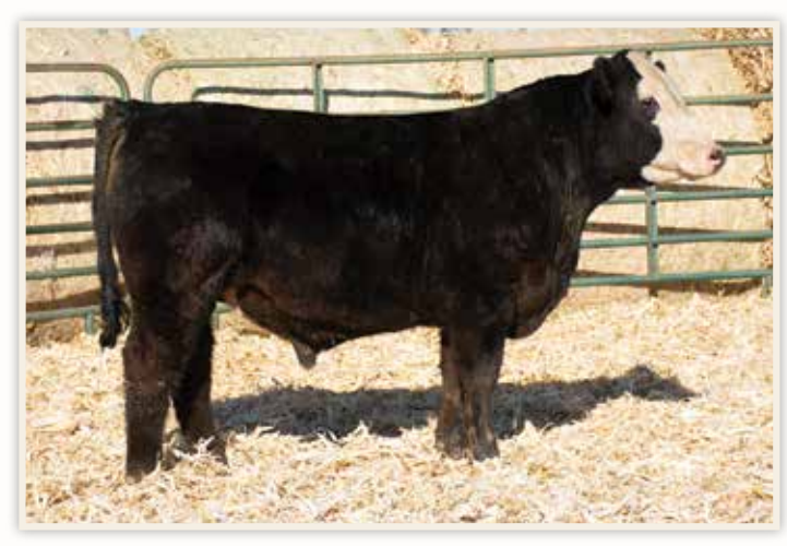
LOT 25 - WCS MAINSTAY 1020J