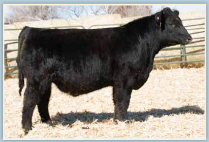
LOT 45 - VOLK BULL J333

3/14/21 REG 4017187 TATTOO J333 SCURRED BLACK