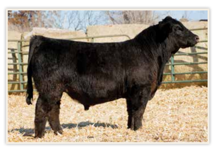
LOT 6 - WCS HIGH ROAD 190J