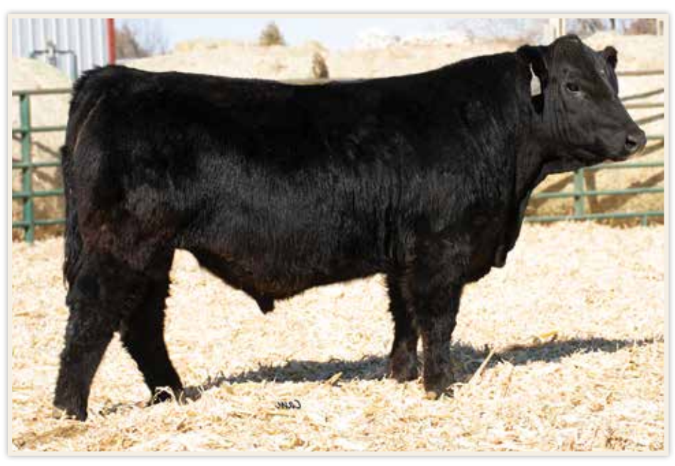
LOT 33 - PCK ADMIRAL

PCK Admiral has one of the most impressive EPD profiles of any purebred in the entire offering. He has twelve traits that rank above breed average, with highlights including a combination of calving ease and performance traits.