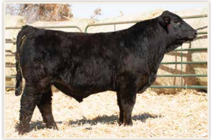
LOT 41 - WCS RUGER 1099J