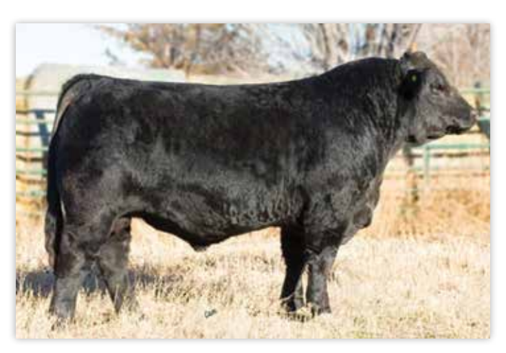
PATERNAL GRAND SIRE TO LOTS 42 & 43 HARKERS ZERO TOLERANCE