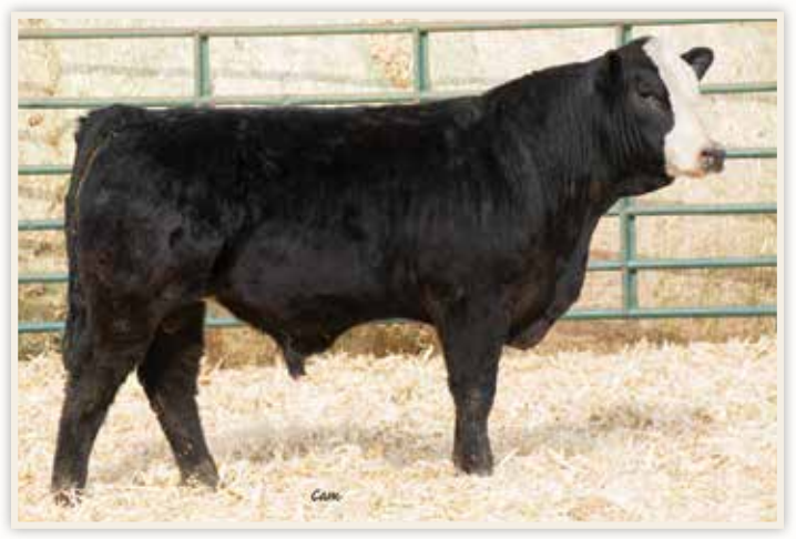
LOT 22 - WCS MAINSTAY 115J

2/27/21 REG 3930428 TATTOO 115J HOMOZYGOUS POLLED HOMOZYGOUS BLACK