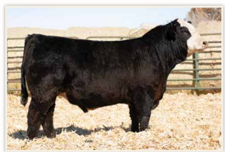
LOT 19 - WCS MR STABILIZER 1814J