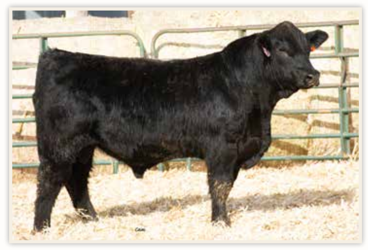
LOT 16 - WCS MAINSTAY 1809J

2/28/21 REG 3959159 TATTOO 1809J HOMOZYGOUS POLLED HOMOZYGOUS BLACK