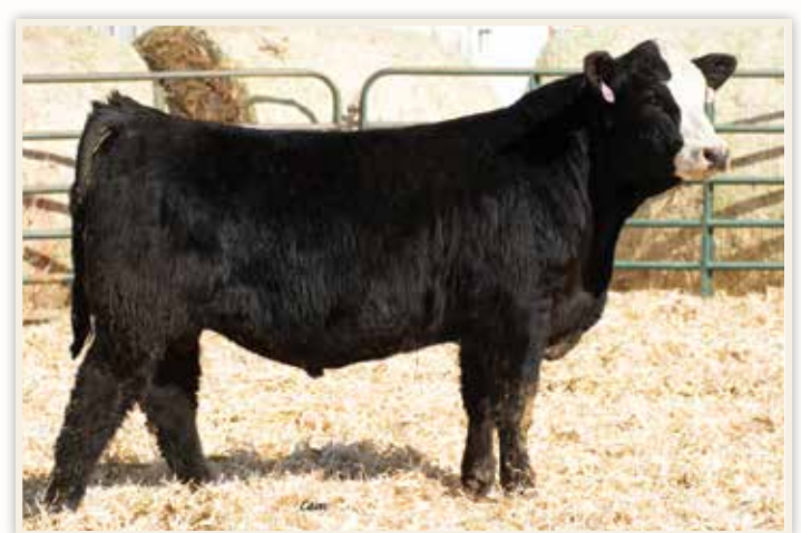
LOT 17 - WCS MAINSTAY 1813J

• The combination of power and shape, he too will be a source of growth and pay weight. Securing one or more of these full brothers will supply added consistency to a calf crop, offering just more value to potential feeder cattle marketing opportunities.