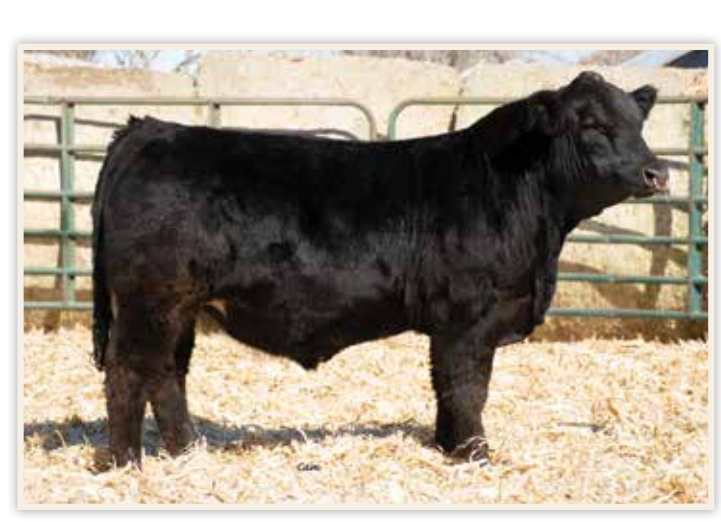
LOT 44 - VOLK TROUBADOUR J313