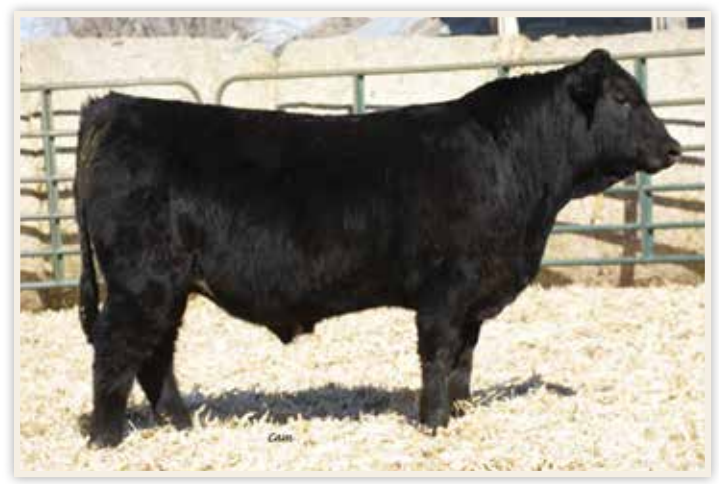
LOT 9 - WCS MR EXPRESS 1132J