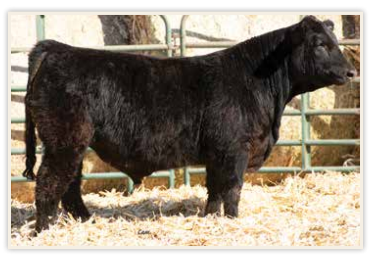
LOT 12 - WCS EXPRESS 1033J