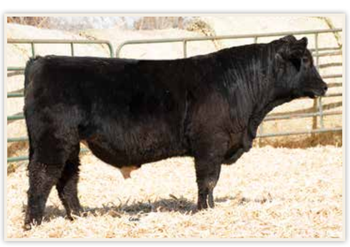
LOT 13 - WCS EXPRESS 155J