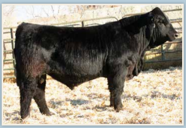
LOT 47 - PCK PATRIOT