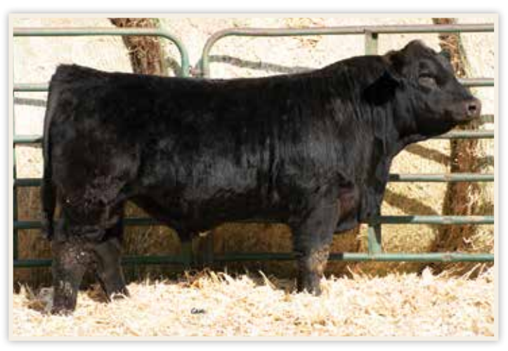
LOT 42 - PCK COLONEL