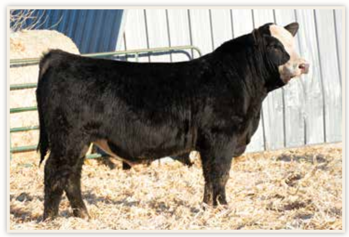
LOT 23 - WCS MAINSTAY 198J

A three quarter blood that will sire calves with massive growth potential as they mature. This baldy is a stout cowman's bull that is extra wide and burly in his muscle shape, he is masculine headed, wide based and big footed. He is the type that will make a quick and potent influence to the profit margins of your calf crop through injecting additions of pounds and carcass yield in the first generation.