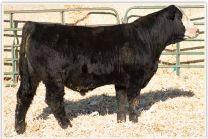
LOT 39 - WCS MR GLOCK 1005J

REG 3930510 TATTOO 1005J HOMOZYGOUS POLLED HOMOZYGOUS BLACK