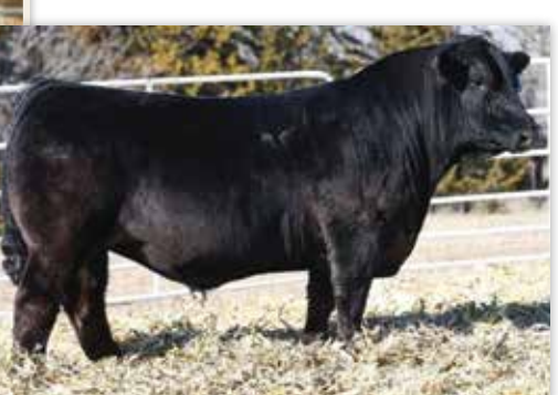
LOT 32 - WCS REST EASY 126J