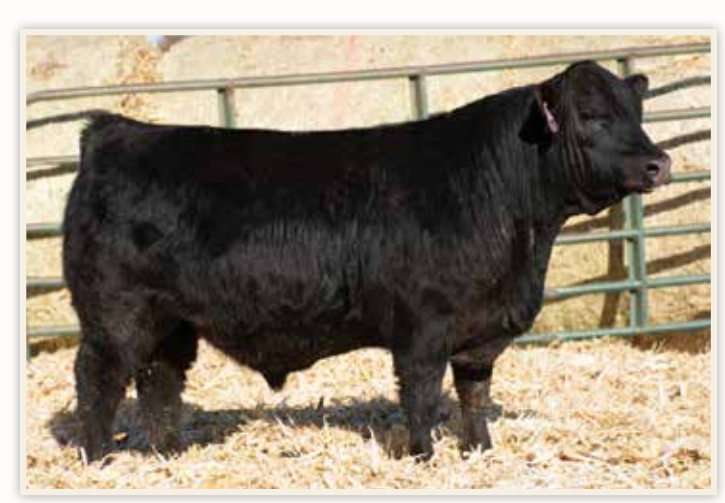
LOT 40 - WCS MR RUGER 186J