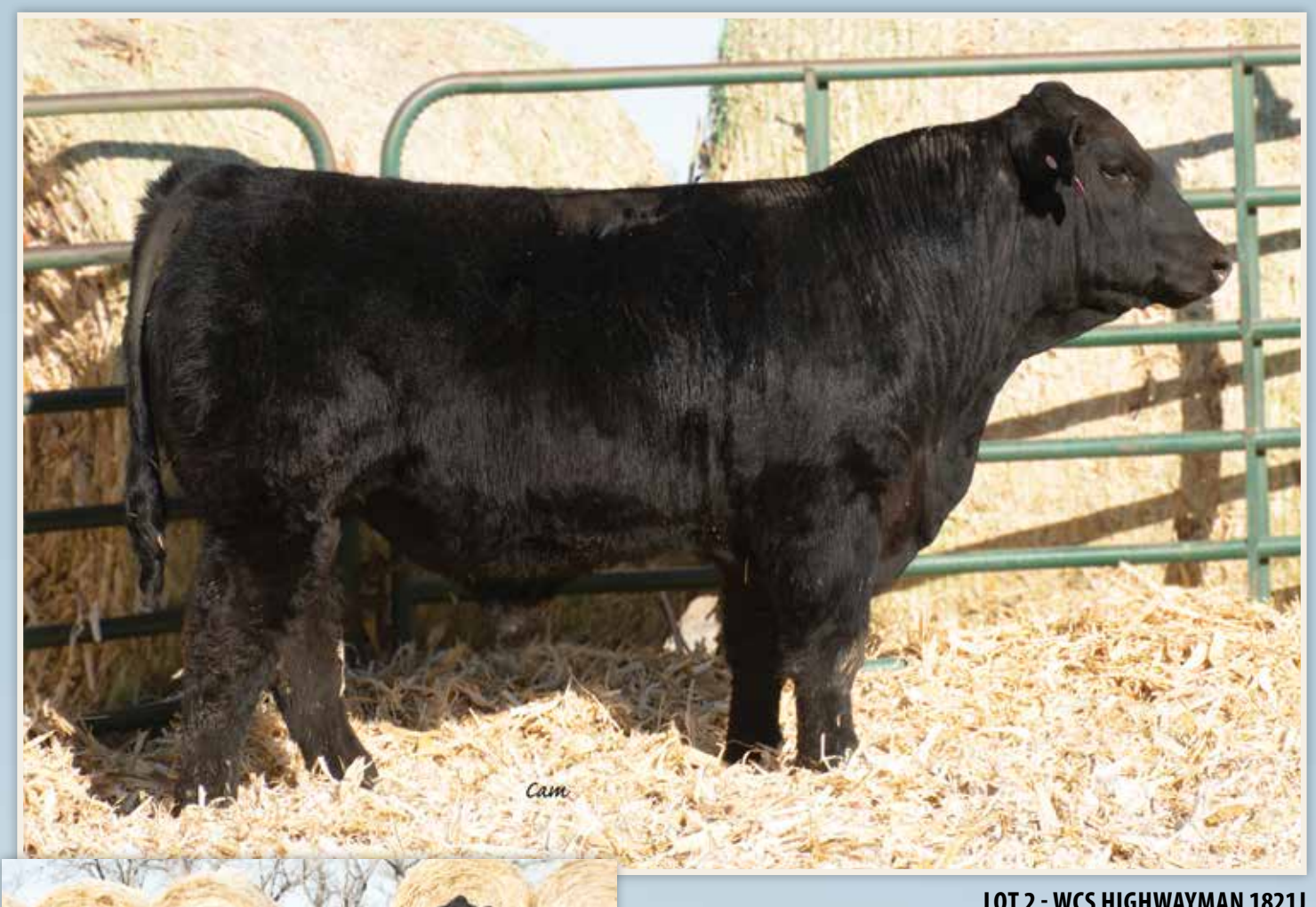
LOT 2 - WCS HIGHWAYMAN 1821J

REG 3959150 TATT00 1821J HOMOZYGOUS POLLED HOMOZYGOUS BLACK