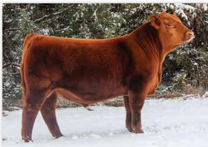
AHL FLASHBACK 446B - MATERNAL GRANDSIRE OF LOT 34