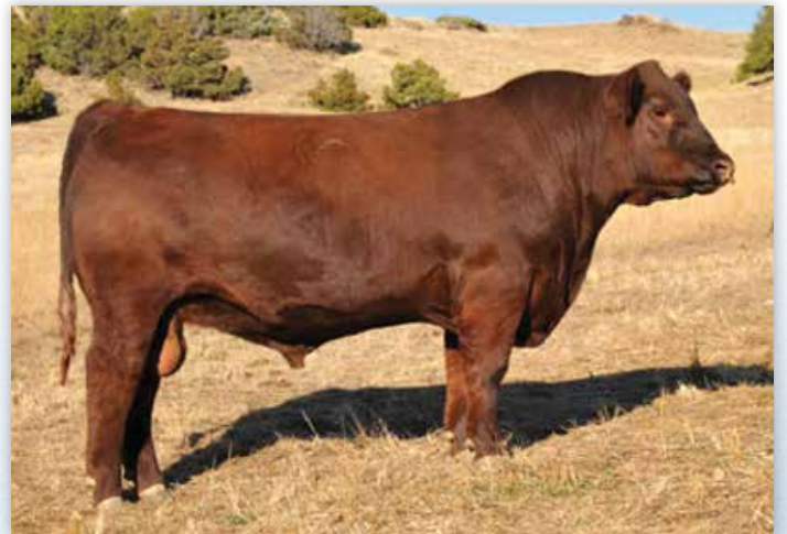
PIE CODE RED 9058 - SIRE OF LOT 56