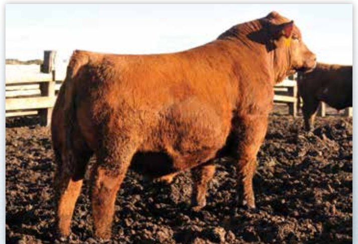
9 MILE BLOCKOUT 7102 - SIRE OF LOTS 1-21