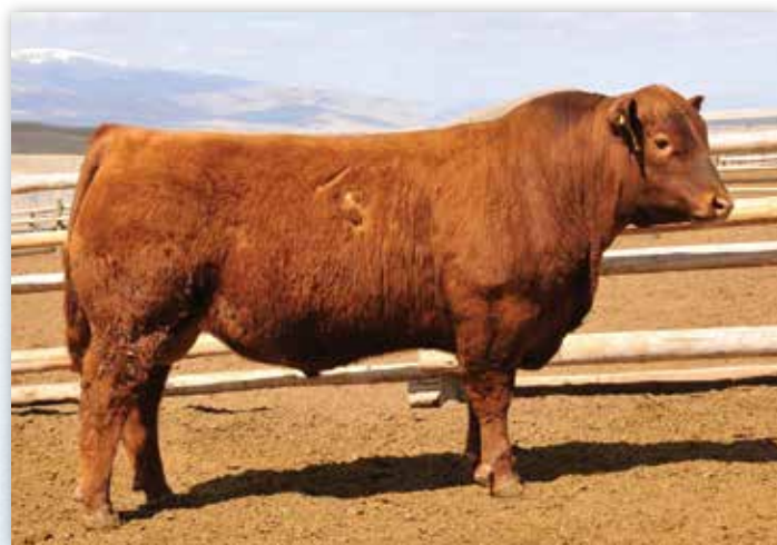
5L BLOCKADE 2218-30B - PATERNAL GRANDSIRE OF LOTS 1-21