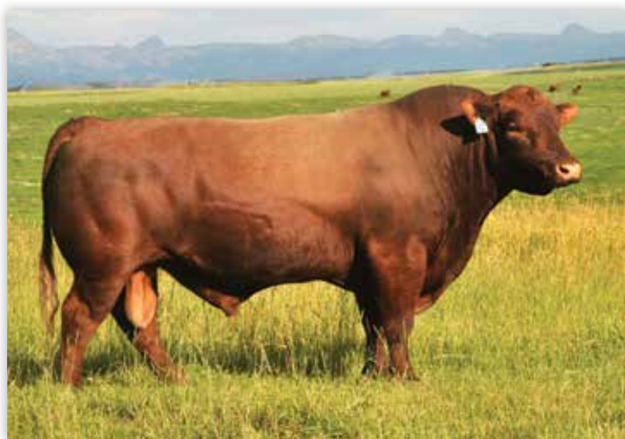
BUF CRK THE RIGHT KIND U199 - MATERNAL GRANDSIRE OF LOT 62