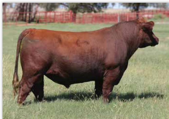
PIE NEW TERRITORY 523 - SIRE OF LOTS 87-88