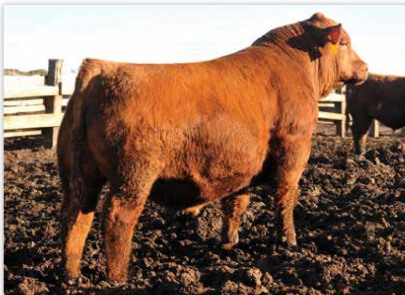
9 MILE BLOCKOUT 7102 - SIRE OF LOT 91