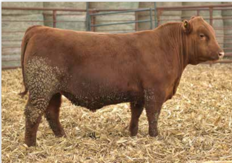
RIDGE GUARDIAN 9079 - SIRE OF LOTS 96-98