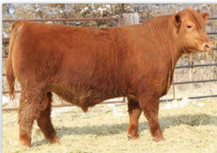
PIE WEIGH UP 8157 - SIRE OF LOTS 50-55