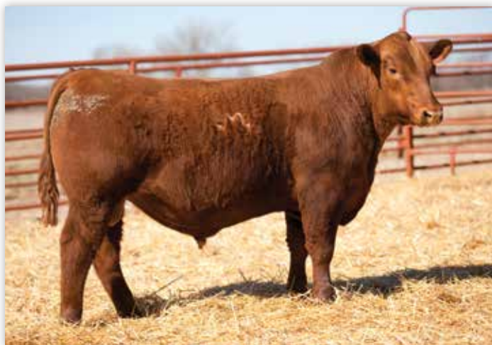
4MC COWBOY KIND 569 - INFLUENTIAL MATERNAL GRANDSIRE OF LOT 12