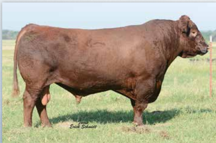
LSF SAGA 1040Y - PATERNAL GRANDSIRE OF LOTS 67