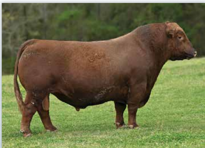
4MC KING OF THE COWBOYS 706 - $105,000 MATERNAL GRANDSIRE OF LOT 58