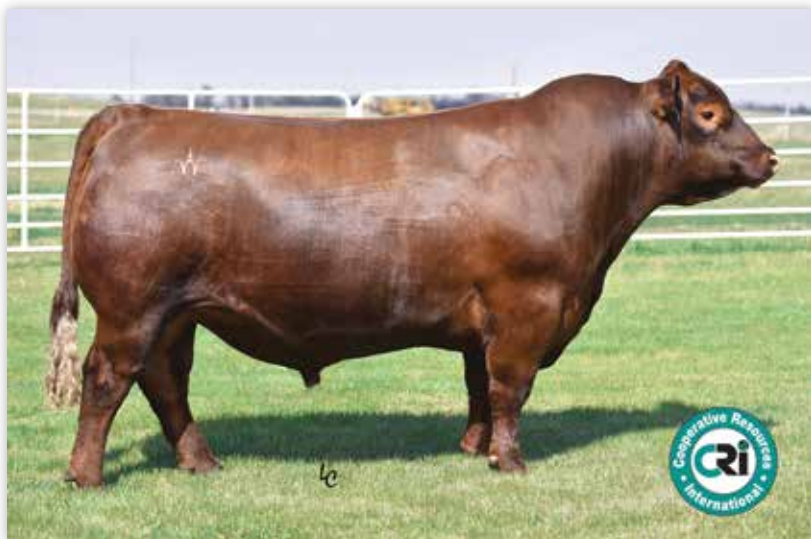
ANDRAS NEW DIRECTION R240 - PATERNAL GRANDSIRE OF LOTS 35-43