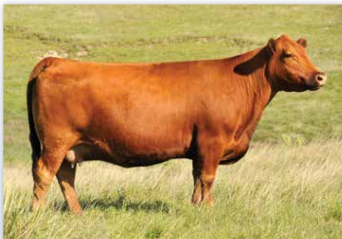
C-BAR ABIGRACE Y11 - PATERNAL GRANDDAM OF LOTS 24-34