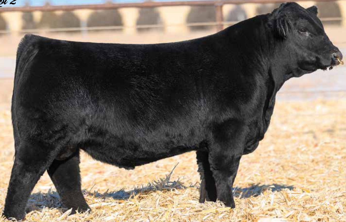
NWSS PEN BULL