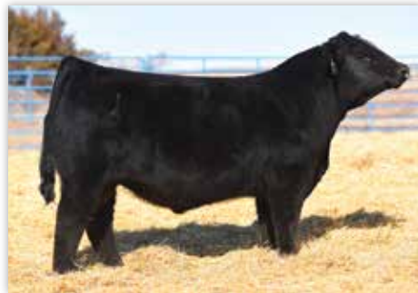
TKCC CERTIFIED 7C $33,000 MATERNAL BROTHER TO LOTS 12-14