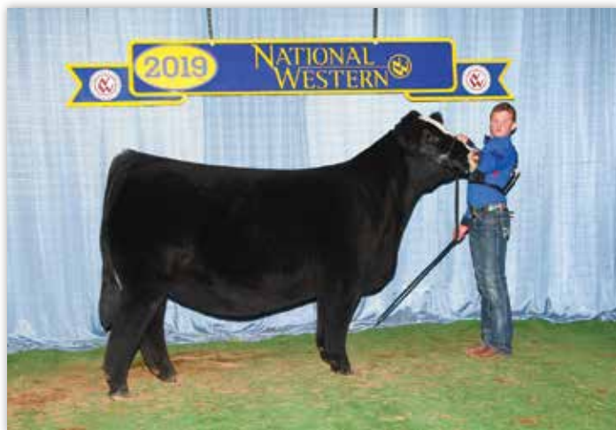
KCC1 HAVANA 83E - DAM OF LOT 33

210J is a blaze faced Berwick son that is backed by KCC1 Havana 83E, making him a maternal brother to the $230,000 KCC1 Countertime 872H and the $60,000 KCC1 SWC Harmony 847H. Havana is one of the most consistent and predictable females that we have ever had in the donor pen. She is from a long line of maternal greats that would include the now deceased TKCC Victoria 57A, and the foundation matriarch Ford RJ Dolly Y83.