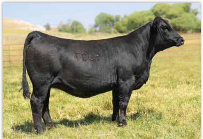
KCC1 MS EXCLUSIVE 9037G - FULL SISTER TO DAM OF LOT 71

Here is a moderate framed, dense made, bold sprung son of TJ Diplomat 294D. He was raised by a first calf heifer that is sired by TJ Cowboy Up 539B and further influenced by MR NLC Sonic T7811. He recorded a moderate birth weight and came to the weaning pen with over 700 pounds of pay weight.