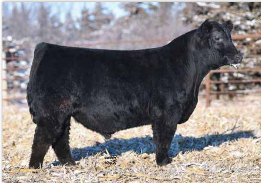
JND MONEY MAKER 813F - FULL BROTHER TO DAM OF LOT 24