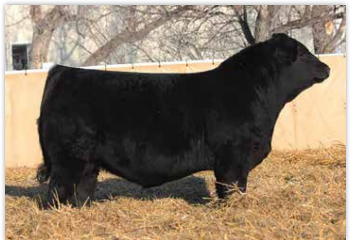
JPCC CONFEDERATE 49G - SIRE OF LOT 34-48