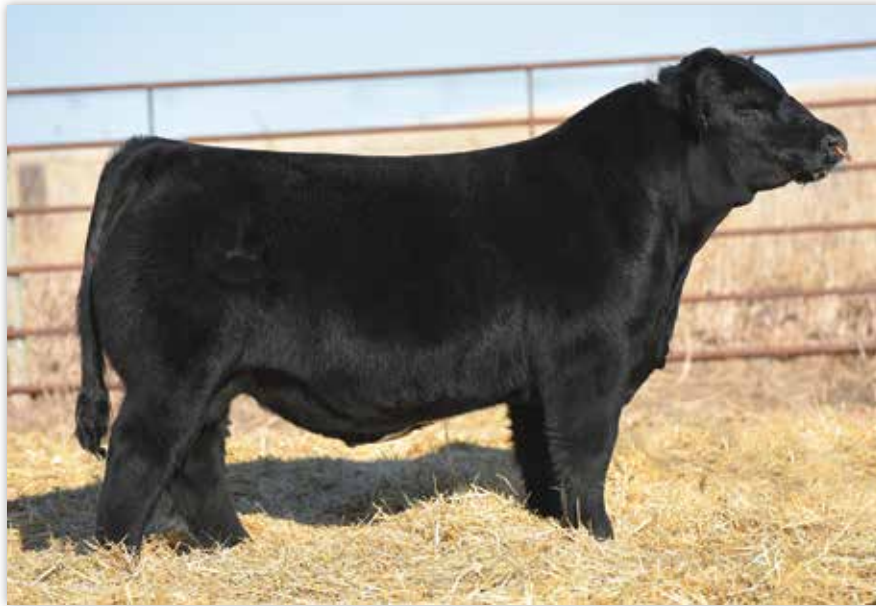
KCC1 ETERNITY 113E - $20,000 SIRE OF LOTS 6 & 7