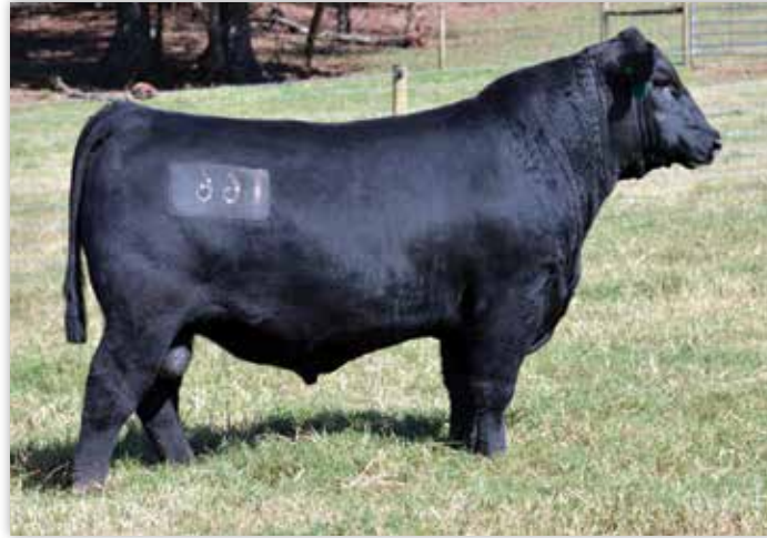
POTTS BROS RIVAL 166 - SIRE OF LOT 83