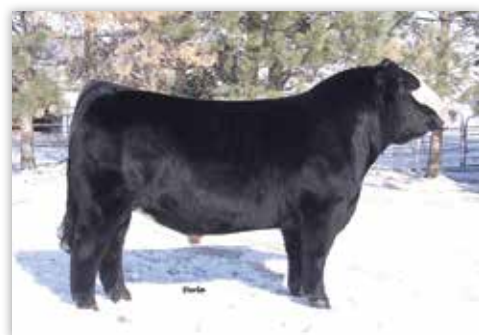
MR HOC BROKER MATERNAL BROTHER TO THE GRANDDAM OF LOTS 17-18

Here is a pair of ET flushmate brothers that combine a unique outcross pedigree that is saturated with maternal excellence. KCC Folsom 512F was a past high seller that is now working in the Lee's Cattle Company program at Brush, Colorado. Folsom is sired by the $400,000 TJ High Calibre 556B and backed by the powerful CCR Ms Misty May 8014U. What makes this pedigree even more interesting is the fact that their maternal granddam is a maternal sister to the great MR HOC Broker. JM/SWC Olivia Y19 is a stout constructed, bold ribbed, sound footed female that offers a complete and total outcross pedigree to Dream On, Upgrade, Legacy and Lock N Load. Here is a pair of brothers that could be used in a series of different breeding programs with tremendous success due to the combination of phenotypic quality, performance, and outcross status.