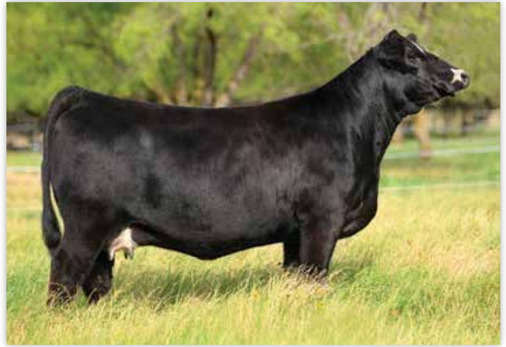
KCC1 ESTELLE 510E - $30,000 DAM OF LOTS 8-11