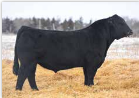
TKCC CARVER 65C $33,000 MATERNAL BROTHER TO LOTS 12-14