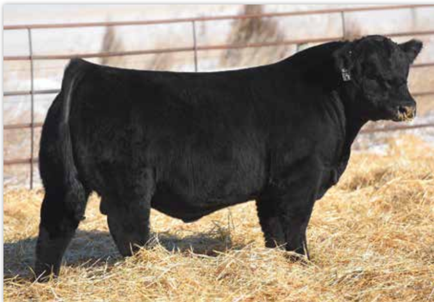
KCC1 ENTERPRISE 519E - $35,500 FULL BROTHER TO SIRE OF LOTS 1-7