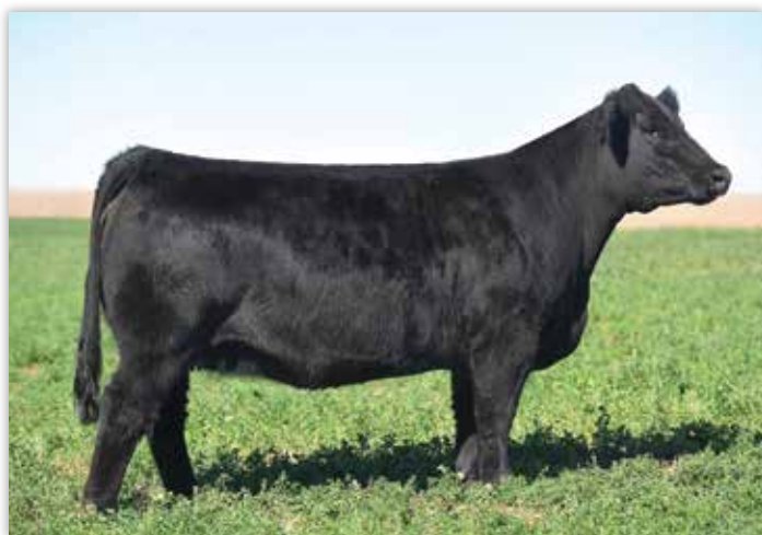
TKCC VICTORIA 57A - FAMOUS MATERNAL SISTER TO LOTS 30-32

Another trio of direct sons from the proven matriarch Ford RJ Dolly Y83. These ET flushmate brothers sired by JBSF Berwick 41F join a long list of maternal brothers and sisters that have forged a path in the breed. Here is your chance to select a direct son of Dolly that is sired by the now deceased JBSF Berwick 41F. These brothers are balanced numerically, offer exceptional weaning weight performance, and chart top third of the breed for marbling.