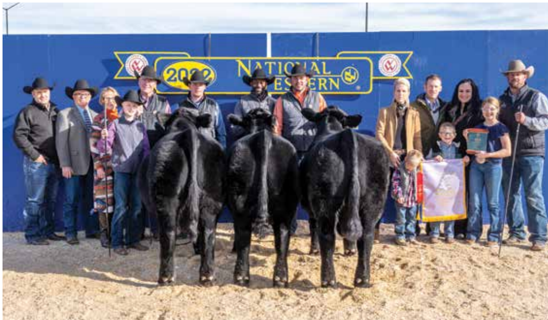
Reserve Champion Pen of Three Purebred Simmental Bulls 2022 National Western Stock Show