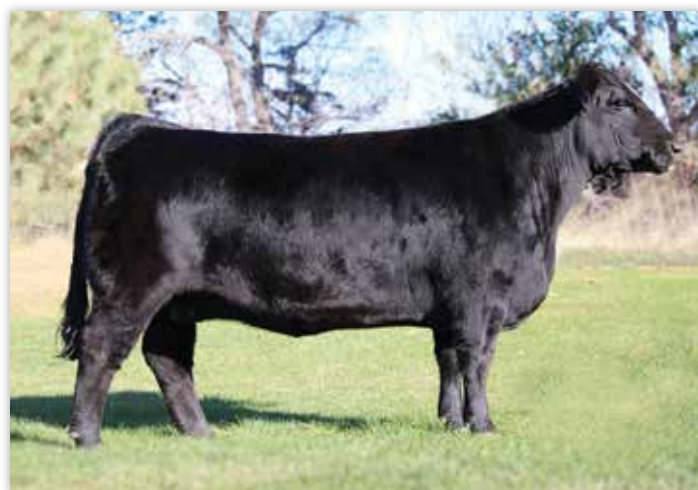
FORD RJ DOLLY Y83 - FOUNDATION MATRIARCH AND DAM OF LOTS 12-14