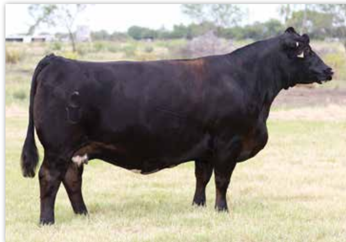
CCR MS MISTY MAY 8014U - DAM OF LOT 15

TKCC War Cry 632J is a big ribbed, deep sided SimAngus stud that is backed by a top producing young TJ Cowboy Up 529B daughter that traces to the maternal greats such as WAGR Driver 706T and Vermillion Dateline 7078. He ranks among the top 25% for WW and top 30% for YW. Here is a moderate birth weight bull that charts among the top third of the business for CE. A potential option for use on well managed heifers.