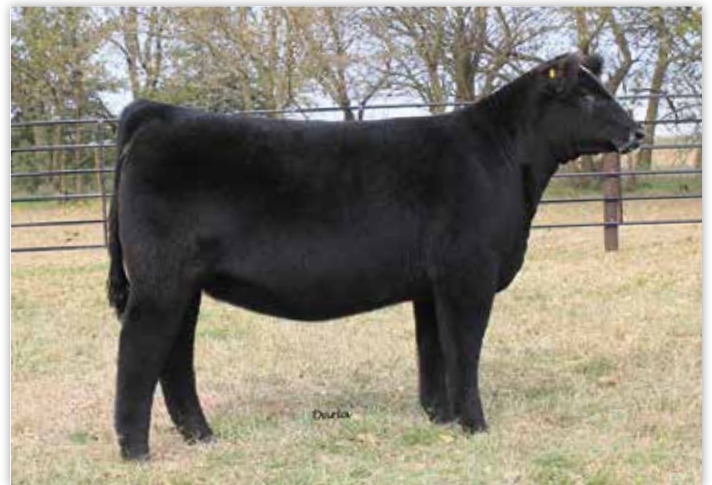
BAILEY'S DREAM GIRL - $135,000 MATERNAL SISTER TO LOTS 1-5