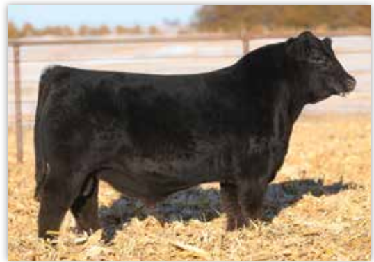
KCC1 HANNITY 536H - MATERNAL BROTHER TO LOTS 26-28