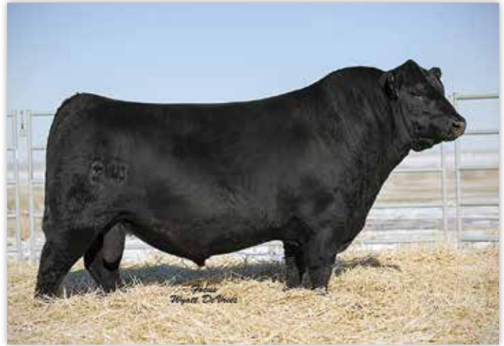
BUBS SOUTHERN CHARM AA31 - MATERNAL GRANDSIRE OF LOTS 80 & 81