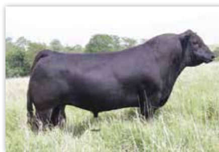
WAGR DRIVER 706T MATERNAL GRANDSIRE OF LOT 40 AND SIRE OF INFLUENCE THROUGHOUT THE OFFERING!

PERFORMANCE DATA BW: 87 ADJ WW: 761 ADJ YW: 1200 ADG: 3.3 WHEATLAND AFFILIATE 7128E WAGR DRIVER 706T JPC CONFEDERATE 49G TKCC MS DRIVER 406B SPRINGCREEK GOLDY 135A TKCC 135Y MEASUREMENTS ADJ. IMF: 2.91 ADJ. BF: 0.12 ADJ. REA: 14.64 SC: 35 CE BW WW YW ADG MCE MLK Doc MWW Stay CW YG Marb BF REA API TI 6.5 4.3 76.1 111.3 0.22 3.2 24.9 9.2 63.3 15.8 28.8 -0.36 0.15 -0.07 0.81 110.4 68.6 99% 99% 50% 65% 80% 95% 35% 85% 35% 45% 60% 15% 85% 15% 25% 85% 90% A big footed, well-balanced son of Confederate that is long spined, and big topped. 406J is from a productive daughter of WAGR Driver 706T. Some of the very best uddered and most fertile females in our program are daughters and granddaughter of the legendary Driver.