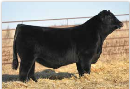
KCC1 EMPIRE 280E - MATERNAL BROTHER TO LOTS 26-28