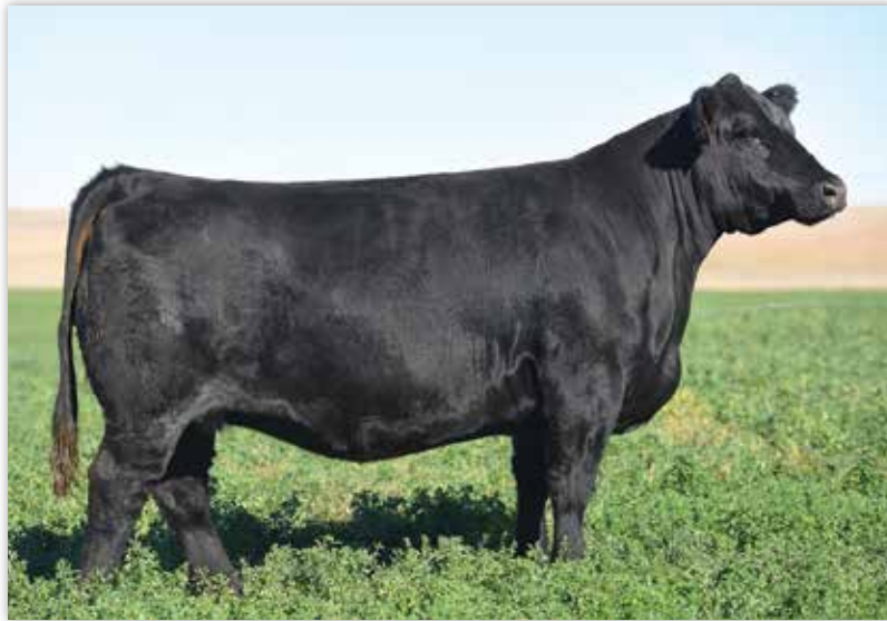
KCC1 TIARA 1Z - MATERNAL SISTER TO DAM OF LOT 64