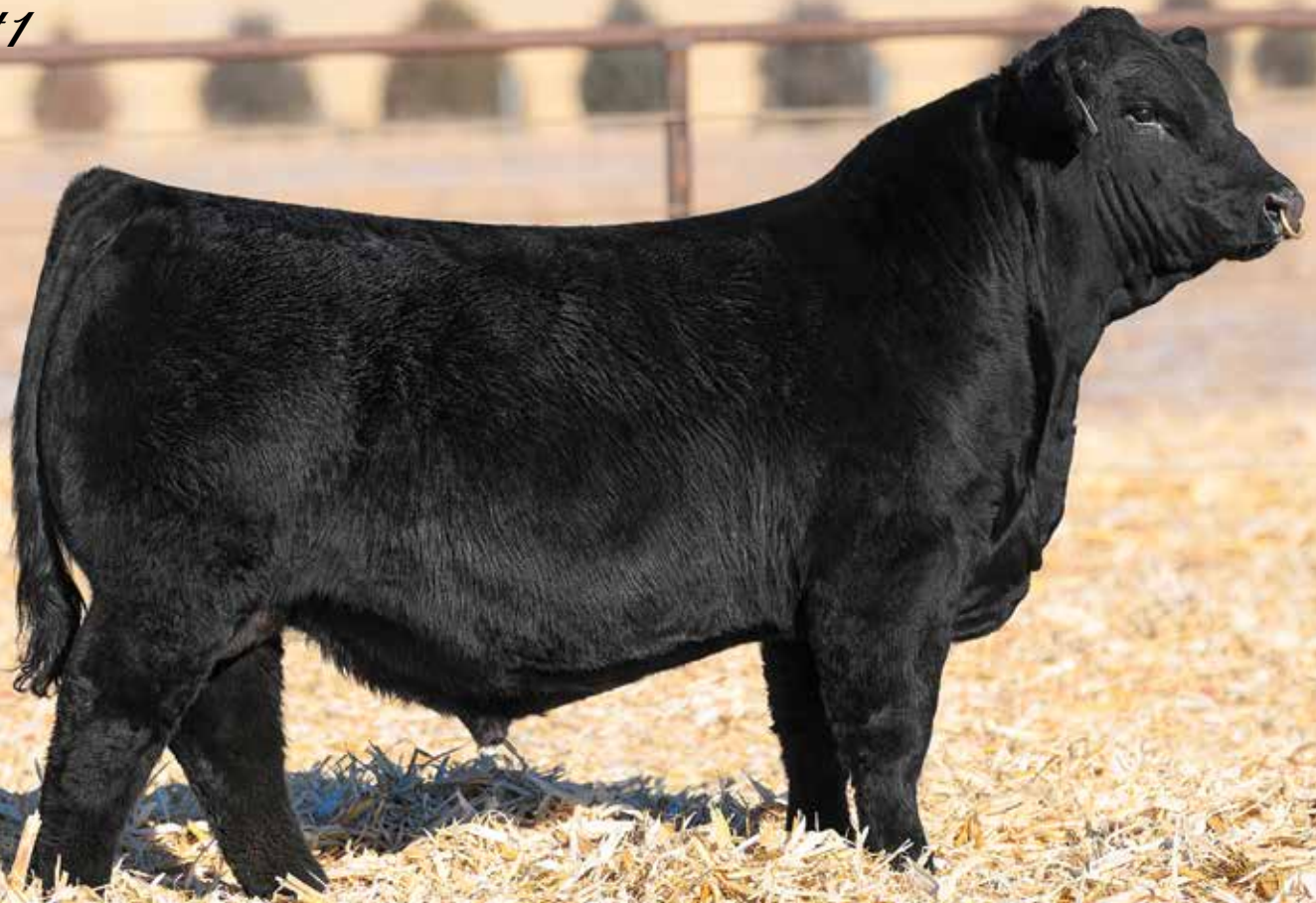
NWSS PEN BULL