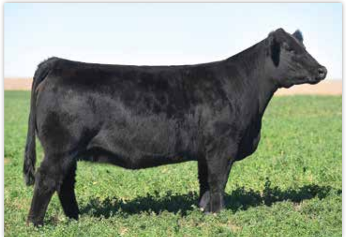
TKCC VICTORIA 57A - MATERNAL GRANDDAM OF LOTS 8-11