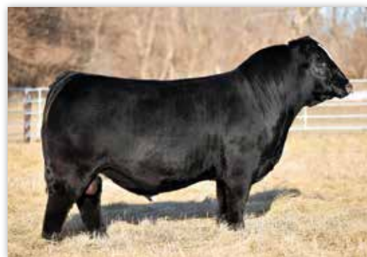
JBSF BERWICK 41F - SIRE OF LOTS 29-33

KCC1 Berwick 46J is a powerful half-blood SimAngus bull that is sired by the $109,000 JBSF Berwick 41F. The dam of 46J was our selection from the Nelson Family Farms female sale as an open heifer calf. We love the stoutness of foot, bone, and body mass that G255 has maintained as she matured into a picture perfect two-year-old female. 46J is big ended, wide based, and backed by the famed Greens Princess 1012 cow family on the bottom side of his pedigree. A sharp featured baldy bull that we are certain will turn heads on sale day!