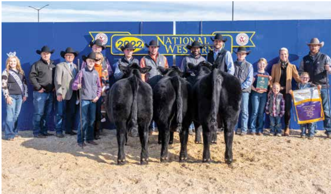
Grand Champion Pen of Three Percentage Simmental Bulls 2022 National Western Stock Show