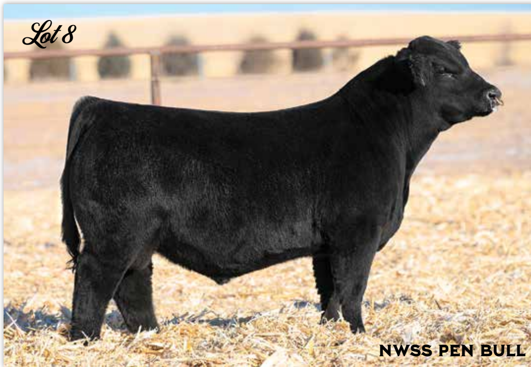
NWSS PEN BULL

The next set of flush brothers are the resulting product derived from mating two individuals of impact that were both bred and raised in the Kearns Cattle Company program. KCC1 War Cry 878G is the sire of this powerful flush of three-quarter blood SimAngus herd bull prospects, while their phenotypically superior dam is the powerful KCC1 Estelle 510E that sold for $30,000 for 1/2 interest. Estelle is a maternal sister to the great KCC1 Havana 83E, the dam of the $230,000 KCC1 Countertime 872H, as well as the $120,000 KCC1 Exclusive 116E. The maternal strength found in the pedigree of this set of ET flushmate brothers runs generations deep on both sides of their pedigree. The dam of War Cry is the now deceased Malsons Savannah 27Y, most widely known as the dam of the industry leading KR Casino 6243. These brothers offer a balanced eye appealing look of quality from every angle. We appreciate the athletic stride, square build, and masculine herd sire look that this set of brothers personify.