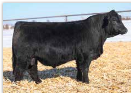
KCC1 BATTLECRY 540H MATERNAL BROTHER TO LOTS 54-57

KCC1 Remedy 1134J is a big centered, loose hidred, sound-built son of Remedy that is backed by a tremendous daughter of MR HOC Broker that is further influenced by Vermillion Dateline 7078. We appreciate the form and function that he brings to the table. An ultra-complete SimAngus bull that is ready for heavy service.