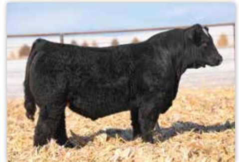
KCC1 EXCLUSIVE 741H MATERNAL BROTHER TO LOT 42