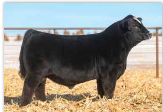
KCC1 COUNTERTIME 872H - $230,000 MATERNAL BROTHER TO LOT 19