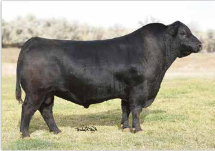
MUSGRAVE 316 EXCLUSIVE - SIRE OF LOTS 78-80