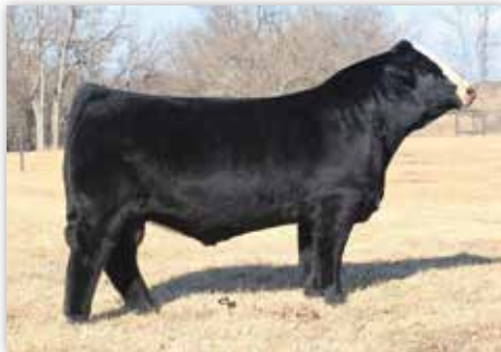
TKCC CLASSIFIED $75,000 MATERNAL BROTHER TO LOTS 12-14