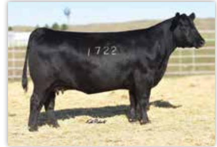
MALSONS SAVANNAH 27Y FAMOUS MATERNAL GRANDDAM OF LOTS 49 & 50