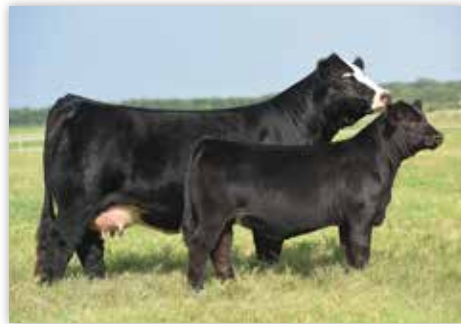
WAGR CHANEL 5073C FULL SISTER TO DAM OF LOT 42