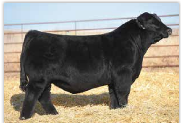
KCC1 EXCLUSIVE 116E - $120,000 SIRE OF LOTS 1-5