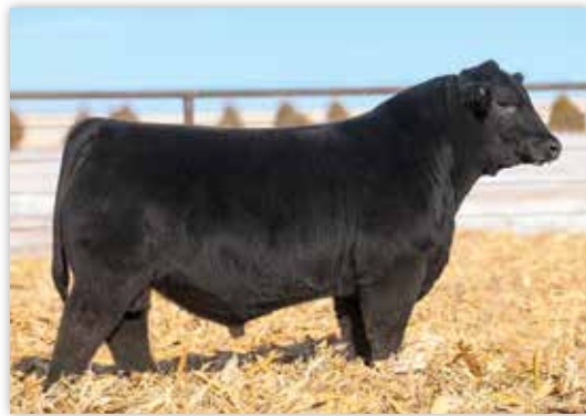
KCC1 HANCOCK 363H - MATERNAL BROTHER TO LOTS 26-28