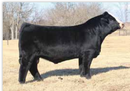
TKCC CLASSIFIED - $75,000 MATERNAL BROTHER TO LOTS 20 & 21

511J and 272J are from the most decorated female in the donor pen at Kearns Cattle Company. Here are TWO direct sons of the prolific Ford RJ Dolly Y83, a female that has made a lasting impact on the program for nearly a decade. Countless maternal brothers have been utilized across the business as AI sires of impact, while TKCC Victoria 57A, a maternal sister to this pair of brothers needs no introduction regarding the legacy that she left behind. Victoria is the dam of the $120,000 Exclusive, as well as KCC1 Havana 83E, the dam of the record selling $230,000 Countertime. These two bulls would be three-quarter sibs to a past high seller at $30,000. They rank among the top third of the breed for performance, while charting top 15% for Marb.