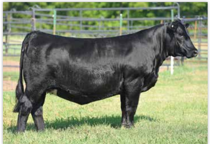
HOC NATASHA D216 - DAM OF LOT 41

KCC1 Confederate 1158J is another Confederate son that is backed by HOC Natasha D216, a beautiful daughter of MR TR Hammer 308A ET that goes back to the influence of D H D Traveler 6807. We partnered with La Palma Cattle Company on this young female in the Black Label Event a few years back. Here is one of the stoutest and biggest ribbed Confederate sons on offer.