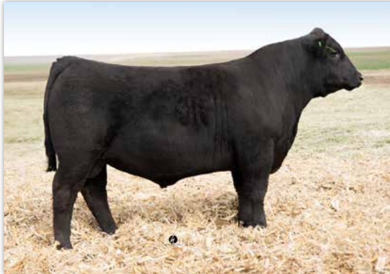
CCR WICHITA 4069D - SIRE OF LOT 69 & 69A