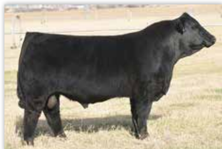
KCC1 PINNACLE 118Z MATERNAL GRANDSIRE OF LOTS 36 & 37

PERFORMANCE DATA BW: 83 ADJ WW: 749 ADJ YW: 1200 ADG: 3.4 WHEATLAND AFFILIATE 7128E KCC1 PINNACLE 118Z JPC CONFEDERATE 49G TKCC MS PINNACLE 035C SPRINGCREEK GOLDY 135A KCC MS WKC 32 MEASUREMENTS ADJ. IMF: 4.38 ADJ. BF: 0.27 ADJ. REA: 14.23 SC: 38 CE BW WW YW ADG MCE MLK Doc MWW Stay CW YG Marb BF REA API TI 6.5 3.7 71.8 105.3 0.21 1.6 23 9.2 59.7 14.9 31.6 -0.39 0.03 -0.08 0.88 112.5 68.2 99% 99% 65% 75% 85% 99% 50% 85% 55% 55% 50% 10% 99% 10% 15% 85% 90% 507J is a three-quarter sib in blood to 604J, being sired by Confederate and supported by a Pinnacle daughter maternally. A maternal brother was purchased in 2020 by Tom Coolahan of South Dakota.