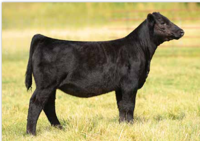
TKCC BLACKCAP MAY 1758H - MATERNAL SISTER TO LOT 24

1239J is another standout Folsom son that offers a moderate birth weight to accompany his strong maternal pedigree. He traces to the great Vermillion Dateline 7078 on the bottom side of his pedigree.