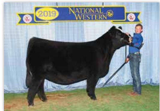
KCC1 HAVANA 83E - DAM OF LOT 19

KCC1 Folsom 76J is a maternal brother to the record setting KCC1 Countertime 872H who commanded $230,000 to the Countertime group in our 2021 bull sale. The dam of 76J is the prolific KCC1 Havana 83E, the only full sister in existence to the $120,000 KCC1 Exclusive 116E. Havana is also the dam of the $60,000 high selling female from the 2020 edition of The Black Label Event. KCC1 SWC Harmony 847H was a Reserve Division Champion at the 2021 Cattlemen's Congress for Megan Brown. Harmony was also selected as the 2021 Cowgirls in Cowtown Grand Champion Simmental Heifer. This past summer she was the dominant Grand Champion Purebred Heifer at the 2021 AJSA South Central Regional in Springfield, MO. Other high sellers from KCC1 Havana 83E would include progeny that have sold for $30,000, $25,000, $11,000, and $8,000. A true sale feature that has the credentials of a herd bull!