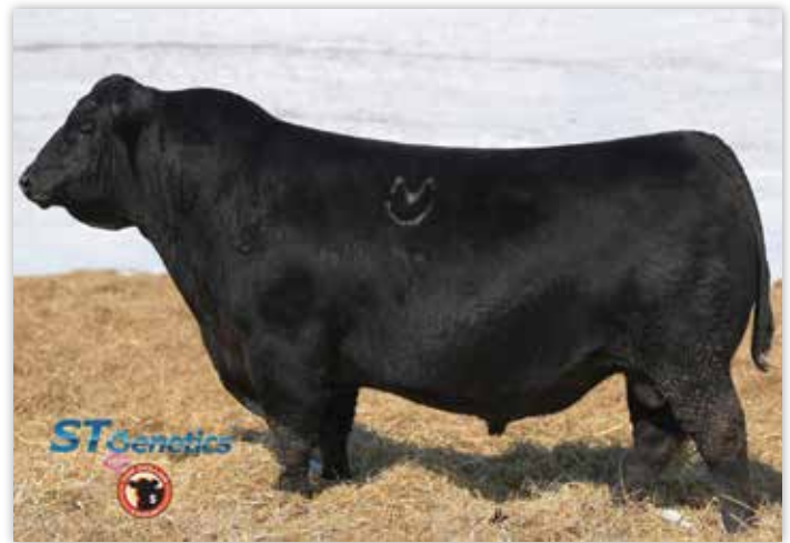
B/R MVP 5247 - SIRE OF LOTS 73-76

We made the investment in a set of bred heifers straight from the heart of the TD Angus program, and we couldn't be more pleased with how those females have calved and the job they did raising their first set of calves. KCC1 MVP 1012 is the first son of the ST Genetics standout B/R MVP 5247. We appreciate the blend of calving ease, performance, and carcass merit that 1012 brings to the equation. Qualified for the CAB "Targeting the Brand" program.