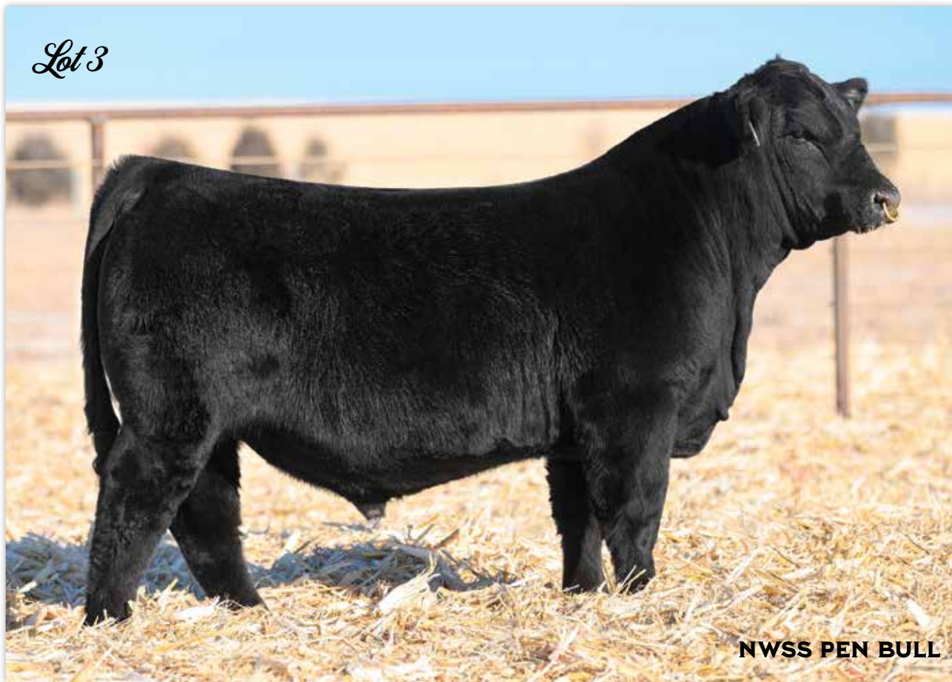
NWSS PEN BULL