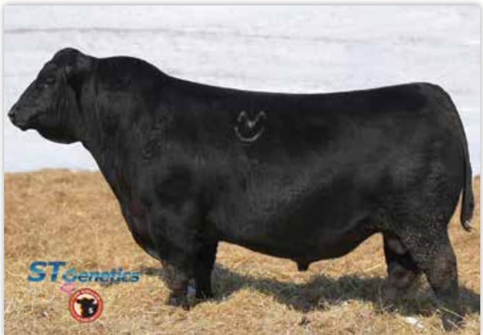
B/R MVP 5247 - SIRE OF LOTS 65 - 68

1061J is a maternal grandson of B/R Ruby of Tiffany 15, one of the leading donor females in the TD Angus program. T/D Ruby of Tiffany G9310 is a powerful two-year-old daughter of the $400,000 Profit. This quarter-blood SimAngus bull is long, smooth, and flexible on the move. Several Pathfinder dams line the pedigree that supports 1061J. B/R Ruby of Tiffany 15 is also responsible for producing the $25,000 B/R New Day 454-341 sire.