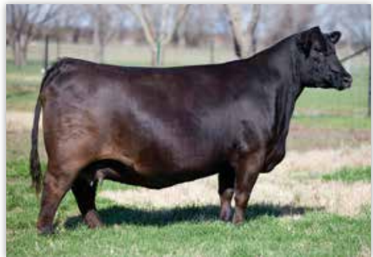
TR MS PRECISION 2077Z - DAM OF LOTS 26-28

TR Ms Precision 2077Z is without a doubt one of the most prolific Angus females that we have been able to incorporate into our SimAngus breeding program. She has produced countless high selling half-blood bulls that were selected by top seedstock and commercial producers across the country. The first set of ET flushmate brothers that sold in 2018 will be recognized as one of the deepest sets of flush brothers that we have ever offered. KCC1 Empire sold for $20,000 to Krebs Ranch, KCC1 Execute 109E sold for $22,000 to KenCo Cattle Company, and several other flushmate brothers sold from $7,500 to $12,000 to operations across the country. This trio of brothers offer breeding leading figures that rank them among the top 4% of the breed for YW and ADG, top 10% WW, top 15% MWW, top 15% CW, top 20% API, and top 15% TI. They are homozygous black and homozygous polled half-blood herd sire prospects that will leave behind a sensational set of replacement females. Pick and choose which brother you like best or turn out all three to experience the full affect!