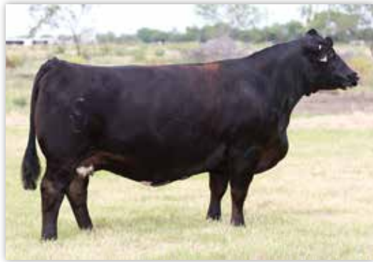
CCR MS MISTY MAY 8014U - DAM OF LOT 54-57