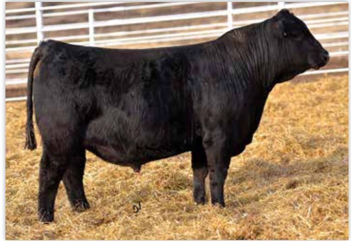
TJ DIPLOMAT 294D - SIRE OF LOTS 70-72

TKCC Diplomat 932J is backed by a half-blood daughter of KCC1 Empire 280E, the past high selling SimAngus bull that was purchased by Krebs Ranch. The dam of 932J is two-year-old female that did an excellent job during her rookie season of production. He charts top 20% Milk, top 25% MWW, top 25% CW, and top 15% Marb.