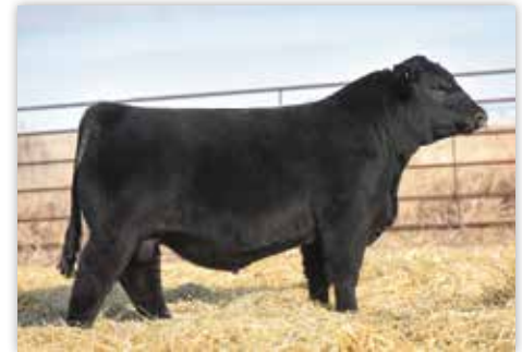
TKCC ESCALADE 1820E $28,000 MATERNAL BROTHER TO LOTS 12-14