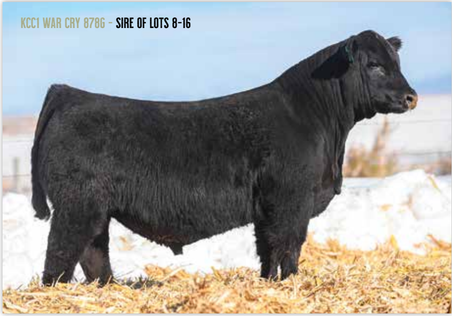
KCC1 WAR CRY 878G - SIRE OF LOTS 8-16