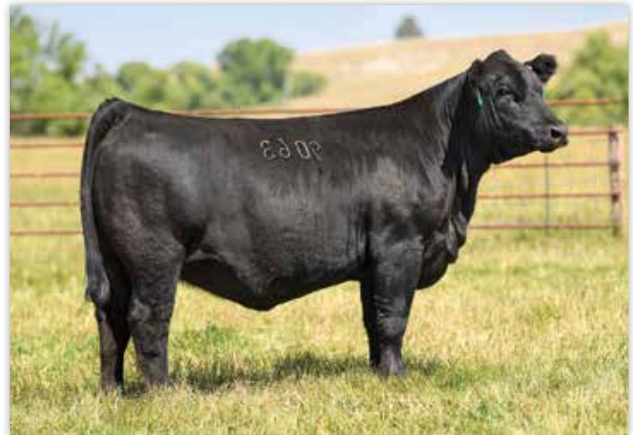
KCC1 MS EXCLUSIVE 9063G - FULL SISTER TO DAM OF LOT 71