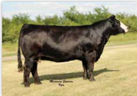
3C MELODY M668 BZ LEGENDARY MATERNAL GRANDDAM OF LOT 42