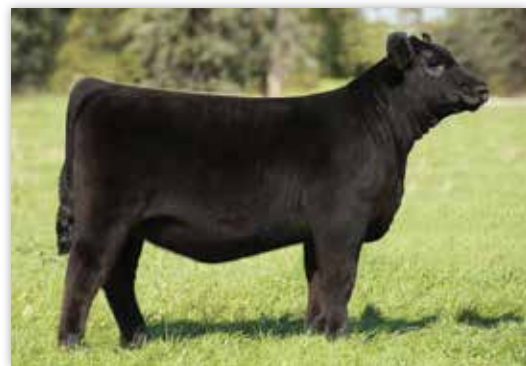
NFF WB PRINCESS G255 - DAM OF LOT 29