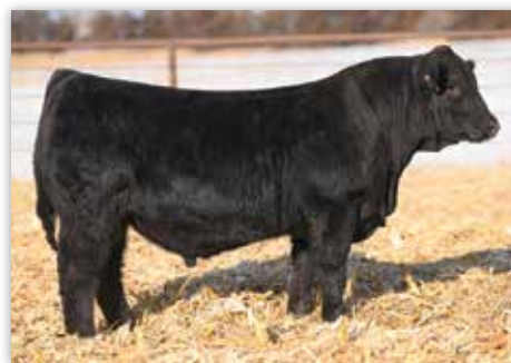
KCC1 TURNPIKE 286H MATERNAL BROTHER TO LOTS 54-57