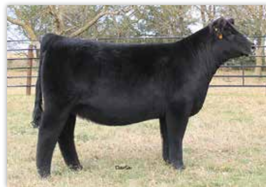
BAILEY'S PROFIT'S DREAM - $195,000 MATERNAL SISTER TO LOTS 1-5