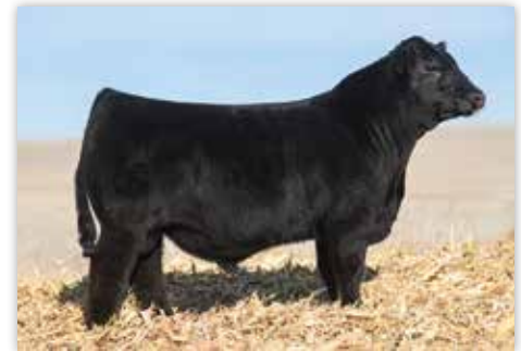
TKCC FROST 38F $40,000 THREE-QUARTER BROTHER TO LOTS 12-14