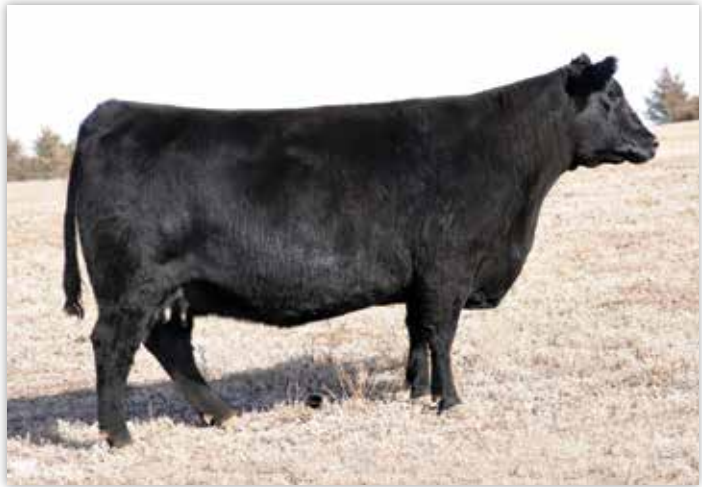
B/R RUBY OF TIFFANY 15 - MATERNAL GRANDDAM OF LOT 65

The next three bulls are full sibs in blood sired by the ST Genetics standout, B/R MVP 5247. All three of these bulls were raised by two-year-old first calf heifers that are ET flushmate sisters. The three first calf heifers are sired by the $400,000 Profit and backed by the strong maternal influence of TEX Young Lucy 9010, a top producing donor dam sired by B/R Ambush 28. All three of these bulls offer moderate birth weights, and their dams brought them to the weaning pen with excellent pay weight. We appreciate the sound structural build, body dimension, and overall balance that these three full sib brothers in blood offer. If you're looking for a low percentage SimAngus bull to maintain the maternal strength in your cowherd, while capitalizing on heterosis, then pay attention here!