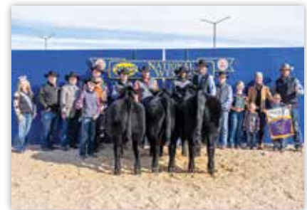
2022 NWSS GRAND CHAMPION PEN OF THREE PERCENTAGE BULLS LOTS 49 & 50 WERE MEMBERS OF THE PEN

The next pair of SimAngus herd sire prospects may very well be the most unique three-quarter blood bulls that we have ever produced at Kearns Cattle Company. They are sired by the record selling $530,000 SO Remedy 7F and supported by a tremendous two-year-old that we IVF'd as a virgin heifer. KCC1 Gwen 9073G is a flushmate sister to the $22,500 high selling bull from two years ago that was selected by Wicks Cattle Company of North Dakota. Gwen is a maternal sister to the legendary KR Casino 6243, one of the most well-respected sires in the Angus breed. Casino semen has been offered to the public on a limited basis, and when made available has sold for over $450 per unit! We admire these two brothers for the structural integrity, flexibility, and real-world performance that they offer. The dam of these brothers offers a picture-perfect udder design and is phenotypically one of the most beautiful young females on the ranch. 538J is a bigger outlined, longer framed bull that offers tremendous eye appeal and presence. 536J is a more moderate framed bull that is unmatched in terms of center body shape, dimension, and density. Help yourself to one of the first Remedy sons to sell, backed by generations of elite cow families!